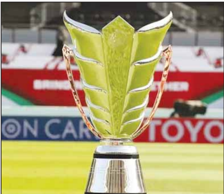
The Asian Cup trophy

by AFC President Sheikh Salman bin Ibrahim Al Khalifa. Japan has also indicated its desire to host the 2035 edition independently, adding another contender to the bidding process. The AFC will now work closely with participating member associations to ensure the submission of all required documentation for their bids. For the 2031 tournament, three other bids have been submitted: India, Indonesia, and a joint bid from Kyrgyzstan, Uzbekistan, and Tajikistan. Meanwhile, Saudi Arabia is confirmed as the host for the 2027 AFC Asian Cup, with the official tournament draw scheduled for April.