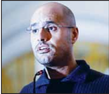
In this Feb. 25, 2011, file photo, Seif al-Islam Gaddafi speaks to the media at a press conference in a hotel in Tripoli, Libya.