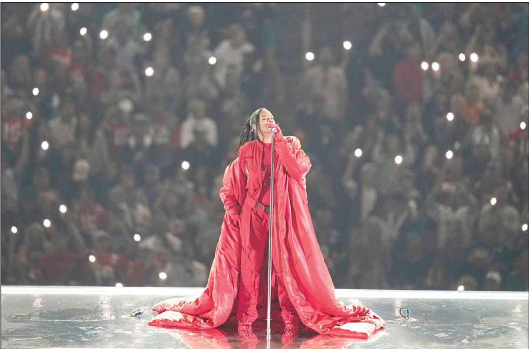
Rihanna performs during the halftime show at the NFL Super Bowl 57 football game between the Kansas City Chiefs and the Philadelphia Eagles on Feb. 12, 2023, in Glendale, Ariz.