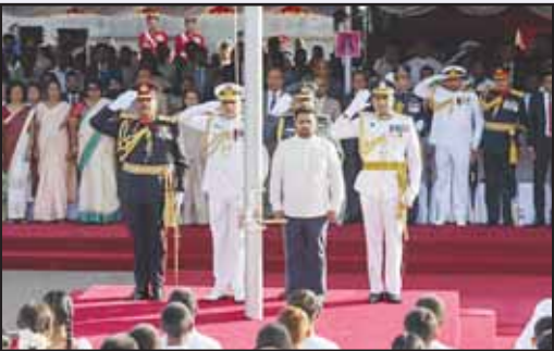
Sri Lankan President Anura Kumara Dissanayake sings the country’s national anthem during the country’s 78th Independence Day ceremony in Colombo, Sri Lanka on Feb 4.

Afghan police arrest 128 drug smugglers: Afghan police have detained 128 individuals on drug smuggling charges during operations over the past week, the country’s Ministry of Interior said in a statement on Wednesday. According to the statement, police detained the suspects for their alleged involvement in the sale, purchase, and smuggling of narcotics during a series of targeted operations conducted in 15 of the country’s 34 provinces. A quantity of illicit drugs, including methamphetamine, hashish, and stimulant tablets, was seized from the