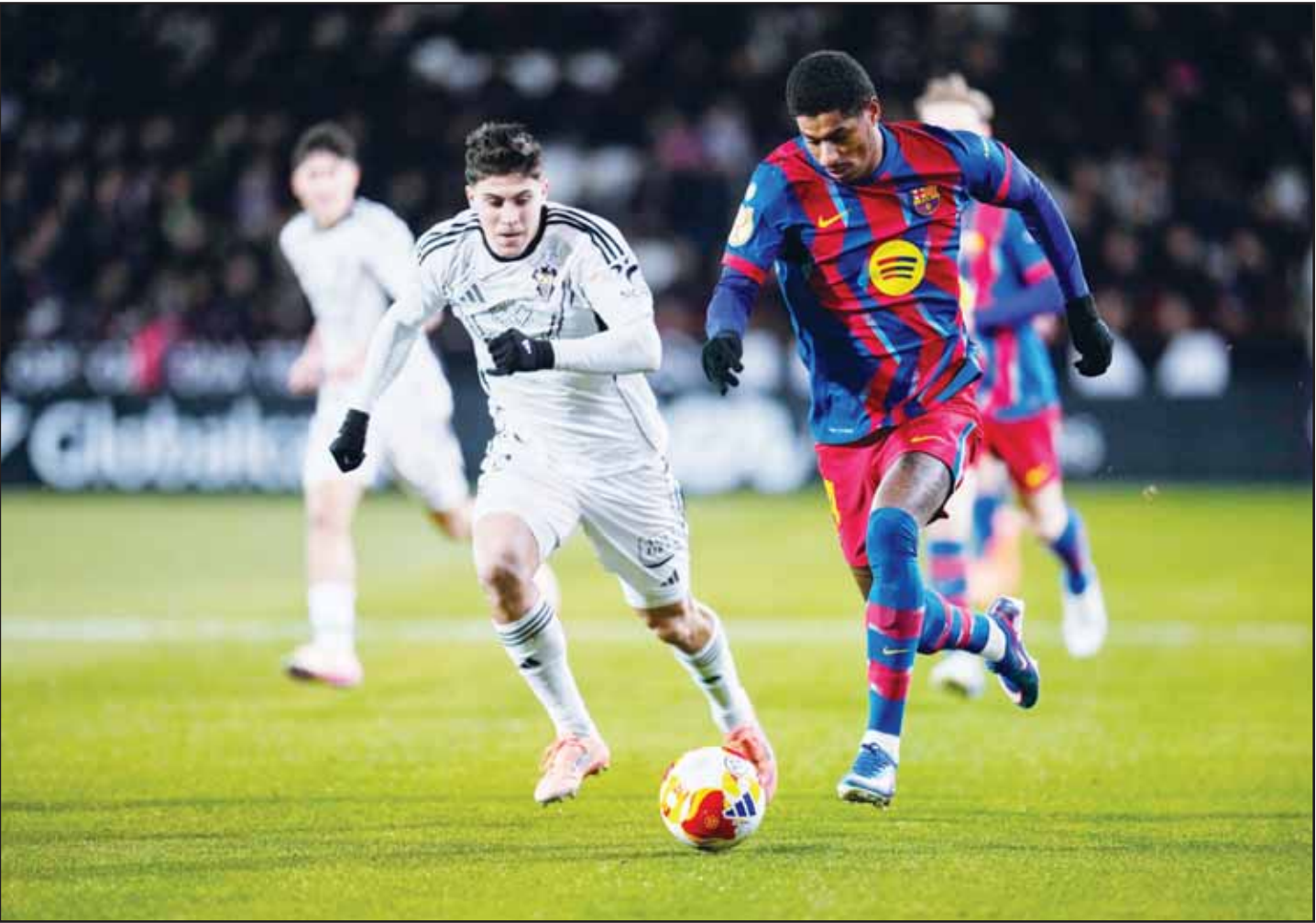
Barcelona’s Marcus Rashford fights for the ball against Albacete’s Lorenzo Aguado during a Copa del Rey quarterfinal soccer match between Albacete and Barcelona, in Albacete, Spain.

Will Jacks (3-14) also starring. Kusal Mendis top-scored with 26 and Pathum Nissanka (23) hit three sixes in his 12-ball knock before slicing Liam Dawson to Jacks on the edge of the circle in the covers. Earlier, England crashed to 34-4 inside the power play after Brook had won his third successive toss and elected to bat. With the ball gripping on the surface, Chameera varied his pace intelligently and made an immediate impact when he had Ben Duckett trapped leg before wicket for a first-ball duck. Matheesha Pathirana struck twice with his slinging action when Bethell was caught behind and Brook lobbed an easy catch to extra cover after being beaten by a slower delivery. England slipped to 47-5 when Theekshana hit the top of Buttler’s stumps with a delivery that zipped back in. Curran then held one end up with a gritty knock that featured six fours and a six. Chameera picked up three wickets towards the end, while Curran fell when he top edged to third man in the final over. “Very disappointed,” Shanaka said. “We lost 3-0. As captain I need to address the areas really well to play a good World Cup. We are looking forward to it and we desperately want to deliver something special.” The World Cup starts Saturday.