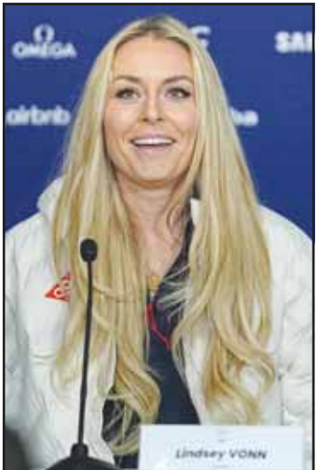
United States' Lindsey Vonn smiles as she arrives for a press conference by the U.S. ski team at the 2026 Winter Olympics, in Cortina d'Ampezzo, Italy.