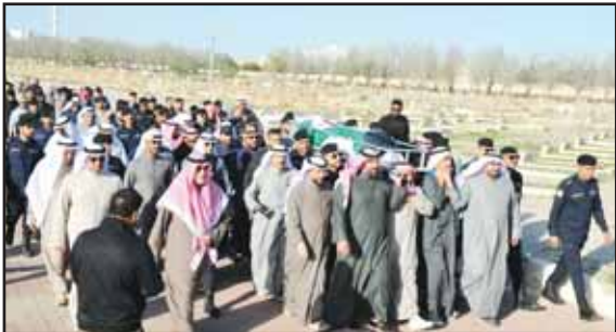
First Deputy Prime Minister and Minister of Interior Sheikh Fahad Yousef Saud Al-Sabah, Undersecretary Major General Abdulwahab Al-Wuhaib, and senior officials pay respects at the military funeral of First Sergeant Khalid Al-Sharaf at Sulaibikhat Cemetery. — See Page 4

Mubarak to the governor: "You must leave your office in a few minutes."