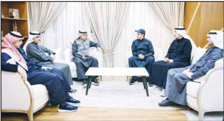
Minister of Youth and Sports meets with officials during a visit to discuss developments in handball and national sports initiatives.

KUWAIT CITY, Feb 4: Dr Tariq Al-Jalahma, Minister of State for Youth and Sports, began his tenure immediately after taking the oath before His Highness the Amir, starting with field visits to key sports federations rather than formal receptions. This proactive approach opens direct communication with club and federation officials, allowing a clear understanding of the real situation beyond office reports. During these visits, the minister can assess the actual needs of each sports body, including funding, facilities, budgets, and organization, while discussing challenges, highlighting achievements, and planning improvements for local tournaments and international competitions for national teams and clubs. Dr. Al-Jalahma's initiative is being hailed as a "strong start", reflecting his commitment to direct engagement with officials and supporting the development of sports in Kuwait. The minister's visits began with