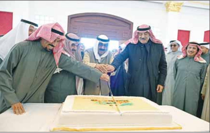
Ceremonial cake-cutting by His Highness the Amir and the Crown Prince.

KUWAIT CITY, Feb 4, (KUNA): In the presence of His Highness the Amir Sheikh Meshal Al-Ahmad Al-Jaber Al-Sabah, His Highness the Crown Prince Sheikh Sabah Khaled Al-Hamad Al-Sabah, First Deputy Prime Minister Sheikh Fahad Yousef Saud Al-Sabah, and Al-Sabah family members, a luncheon was held by Sheikh Ali Jaber Al-Ahmad Al-Sabah at Azayez farm in Kuwait’s northern Al-Abdali area on Wednesday.