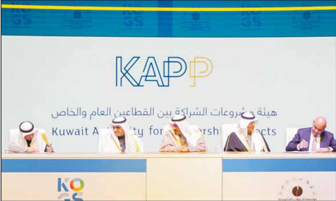
Photo during the conference.