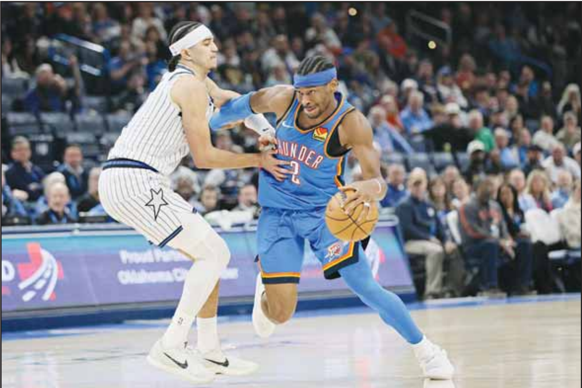
Oklahoma City Thunder guard Shai Gilgeous-Alexander (2) drives against Orlando Magic guard Anthony Black, left, during the second half of an NBA basketball game in Oklahoma City.

ie No. 1 pick’s first meeting with the team he grew up watching because Boston was the closest NBA city to his hometown, about 200 miles south of Newport, Maine. Payton Pritchard scored 26 points for the Celtics, who were playing without Anfernee Simons. Boston acquired Nikola Vucevic for Simons in a trade with Chicago earlier in the day, a person with knowledge of the deal told The Associated Press. Bucks 131, Bulls 115 In Milwaukee, Kyle Kuzma matched a season high with 31 points and the Milwaukee Bucks snapped a five-game skid, beating the Chicago Bulls 131-115 in a meeting of short-handed teams. Milwaukee was missing its top two scorers due to injury, while the Bulls traded away three players earlier in the day. The Bulls sent Kevin Huerter and Dario Saric to Detroit as part of a three-team deal in which they acquired Mike Conley Jr. from Minnesota and Jaden Ivey from the Pistons. They also traded Nikola Vucevic and a second-round pick to Boston for Anfernee Simons and a second-round selection. Chicago was missing leading scorer Josh Giddey due to a strained left hamstring. Cade Cunningham scores 29 points to lead Pistons to 124-121 win over Nuggets Detroit, All-Star Cade Cunningham had 29 points and 10 assists and the Detroit Pistons beat the Denver