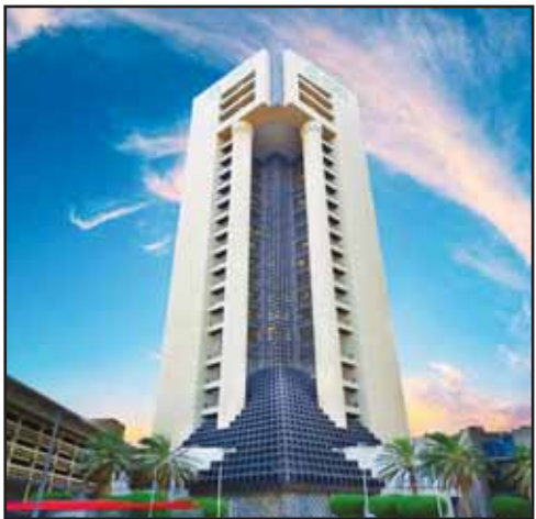
KFH head office

AlShamlan indicated that KFH continues its leading role in supporting economic growth, promoting financial inclusion and supporting the State's ambitious economic vision for a more stable and prosperous financial future, while diversifying the national