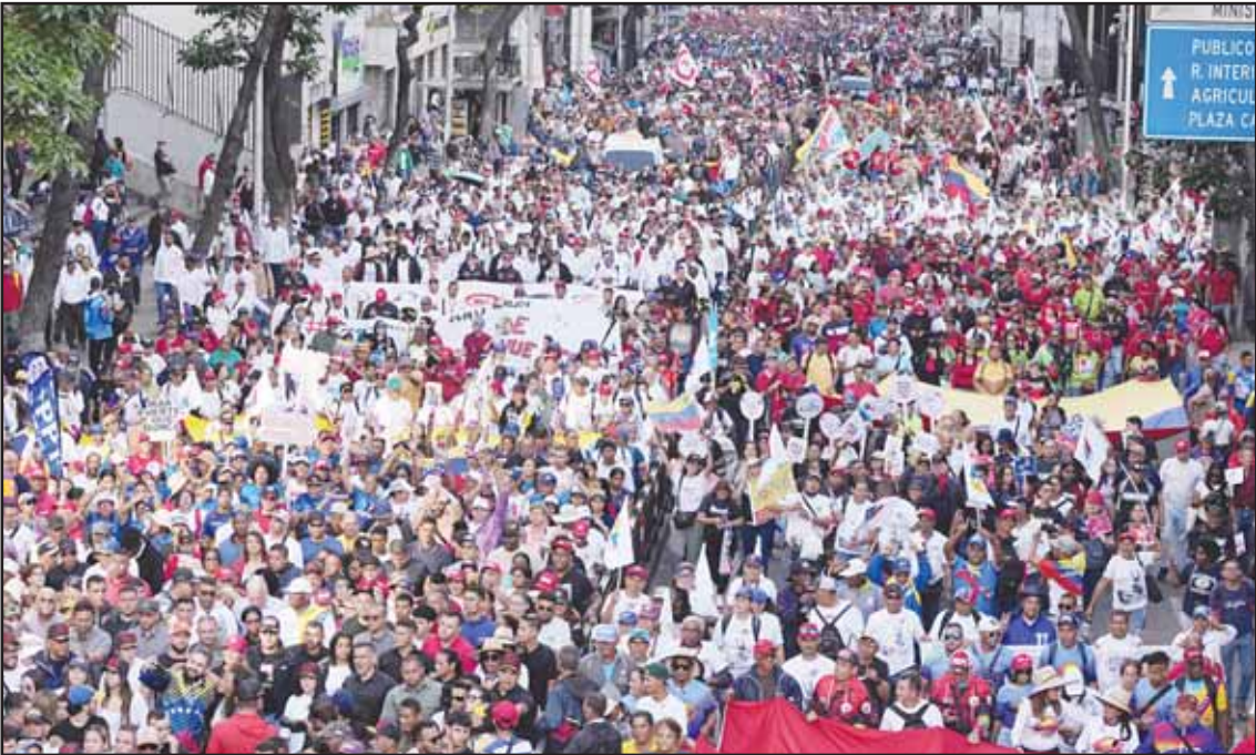
Government supporters call for the release of former Venezuela president Nicolás Maduro and his wife Cilia Flores, a month after US forces captured them, in Caracas, Venezuela, on Feb 3.

son-in-law, Jared Kushner, who also attended last month’s meeting, according to the White House. The current talks also coincide with the expiry of the last remaining nuclear arms pact between Russia and the United States on Thursday. Trump and Putin could extend the terms of the treaty or renegotiate its conditions in an effort to prevent a new nuclear arms race. Last month’s discussions in the Emirati capital, part of a US push to end the fighting, yielded some progress but no breakthrough on key issues, officials said. The Abu Dhabi talks were held amid Ukrainian outrage over major Russian attacks on its energy system, which have occurred each winter since Russia launched its all-out invasion of its neighbor on Feb. 24 2022. A huge Russian bombardment overnight from Monday to Tuesday included hundreds of drones and a record 32 ballistic missiles, wounding at least 10 people. This came despite Ukraine’s understanding that Russian President Vladimir Putin had told Trump he would temporarily halt strikes on Ukraine’s power grid.