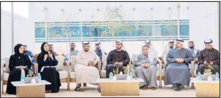
The UAE Fatwa Council organizes an event on historical and religious ties with Kuwait.

Council for Fatwa honors historical and cultural bonds UAE celebrates Emirati-Kuwaiti fraternity ties ABU DHABI, Feb 4, (KUNA): The UAE Council for Fatwa organized on Tuesday an event to celebrate the longstanding fraternal relations between the United Arab Emirates and the State of Kuwait. Held at the Council's headquarters in Abu Dhabi, the event was themed "Emirati-Kuwaiti Fraternity: Historical Roots and Shared Religious Heritage." It was organized as part of the "UAE-Kuwaiti Relations Week," the UAE news agency (WAM) reported. It was held in collaboration with the UAE National Library and Archives and attended by guests specializing in the cultural and historical ties of the Arabian Gulf. The gathering aimed to highlight the spiritual and historical depth of the bilateral bond, reviewing key milestones and showcasing the