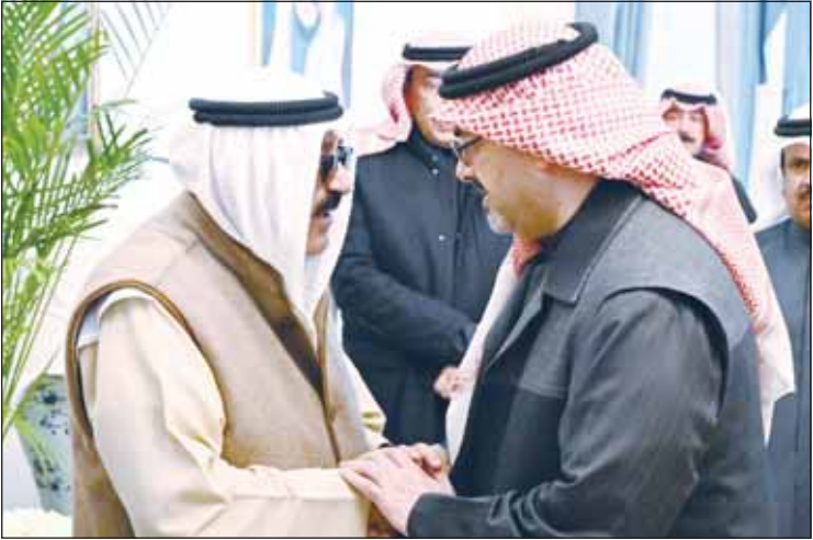
His Highness Sheikh Meshal Al-Ahmad shaking hands with Sheikh Abdullah Al-Salem.