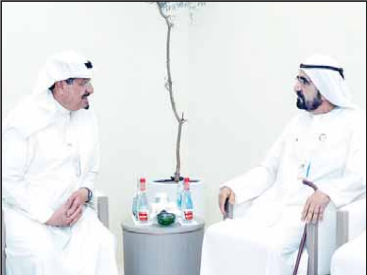
His Highness the Prime Minister Sheikh Ahmad Abdullah Al-Ahmad Al-Sabah meets UAE Vice President, Prime Minister and Ruler of Dubai Sheikh Mohammad bin Rashid Al-Maktoum.