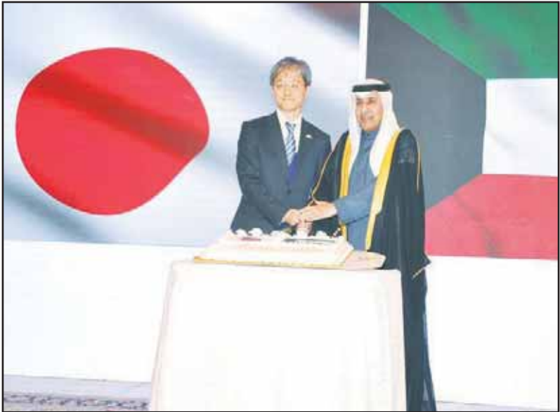
Left: Acting Deputy Foreign Affairs Minister Ambassador Aziz Al-Daihani and Japanese Ambassador Mukai Kenichiro during the ceremonial cake-cutting. Right: Members of the diplomatic corps and guests.