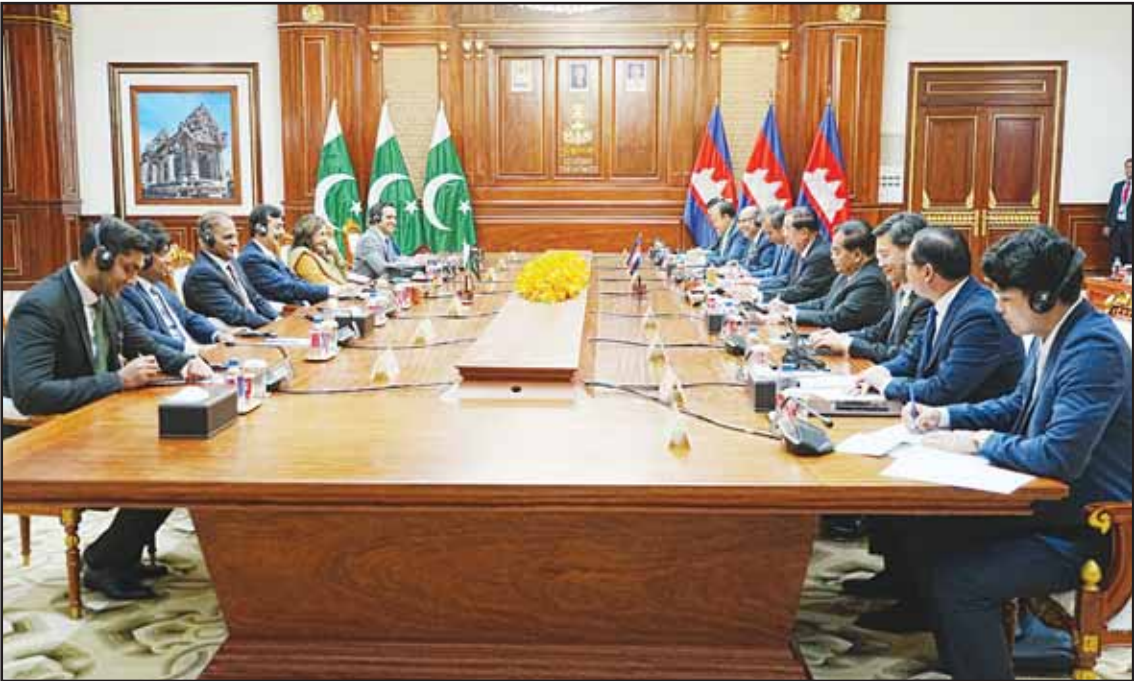
Cambodian President of the Senate Hun Sen, and his Pakistan counterpart Syed Yusuf Raza Gillani, attend a meeting at Vimean Samakipheap in Phnom Penh Cambodia on Feb 2.

gram, came exactly one month after the United States took by force Venezuelan President Nicolas Maduro and his wife, Cilia Flores, in a military raid. Padrino stated that despite “open wounds,” the FANB supports Rodríguez’s efforts to strengthen the democratic system and take necessary actions to facilitate the return of Maduro and Flores. “A month ago, Venezuela was attacked by the world’s largest nuclear power through an unprecedented and disproportionate military operation,” Padrino said, praising Venezuelan troops who responded with available means and forces. (Xinhua)