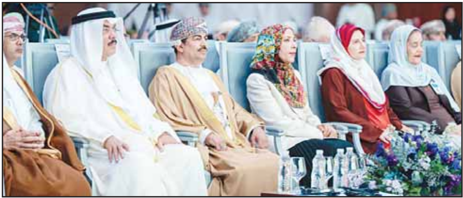
Minister of Education Jalal Al-Tabtabaei participates in the International Conference on the Teaching Profession (ICTP) in Oman, alongside regional and international education leaders.

This came in the ministry’s statement following the participation of Minister of Education Jalal Al-Tabtabaei and his accompanying delegation in the International Conference on the Teaching Profession