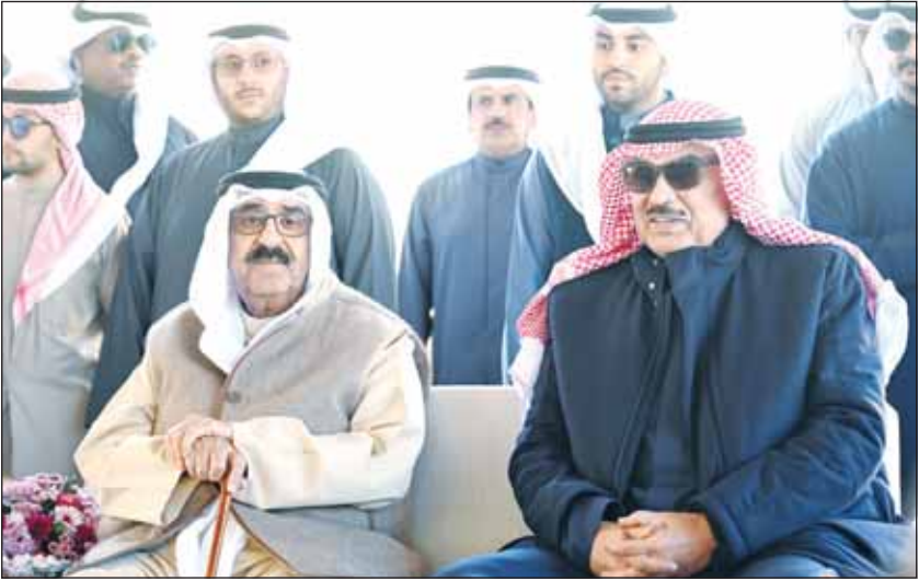
His Highness the Amir Sheikh Mishal Al-Ahmad with His Highness the Crown Prince Sheikh Sabah Al-Khalid.