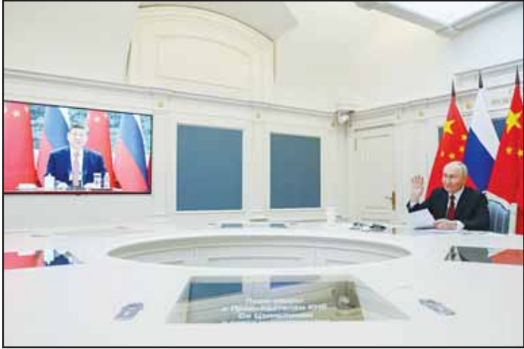
Russian President Vladimir Putin speaks with Chinese President Xi Jinping via videoconference at the Kremlin in Moscow on Feb 4.

BEIJING, Feb 4, (Agencies): Russian President Vladimir Putin hailed his country’s growing economic cooperation with China in a video call with Chinese leader Xi Jinping on Wednesday. The virtual meeting came in the middle of a series of meetings between Xi and Western leaders who have sought to boost ties with China despite differences over Russia’s war in Ukraine. European leaders have pressed China for years to end its support for Russia. China has continued to trade with Russia, providing some relief from Western economic sanctions. “I would like to once again assure you of firm support for our shared efforts to ensure the sovereignty and security of our countries, our socio-economic welfare and the right to choose our own development path,” Putin said in opening remarks that were broadcast by Russian state television. Many of America’s closest partners are exploring opportunities with China following clashes with President Donald Trump over tariffs and his demands to take over Greenland from NATO ally Denmark. The Xi-Putin call followed visits by the British and Canadian prime ministers to Beijing last month. The German chancellor is also expected to visit later this month.