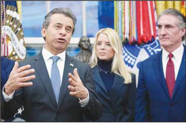
Dr. Marty Makary, commissioner of the Food and Drug Administration speaks at an event on addiction recovery in the Oval Office of the White House, Thursday, Jan. 29, 2026, in Washington, as Attorney General Pam Bondi and Interior Secretary Doug Burgum listen.

“The approval decision remains with the relevant product center, using the center’s normal processes,” stated a slide presented at the meeting and