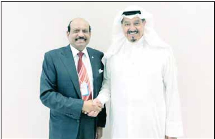
Yusuf Ali MA, Chairman of Lulu Group meets H.H. Sheikh Ahmed Abdullah Al Ahmad Al Sabah, Prime Minister of Kuwait on the sidelines of World Government Summits in Dubai.