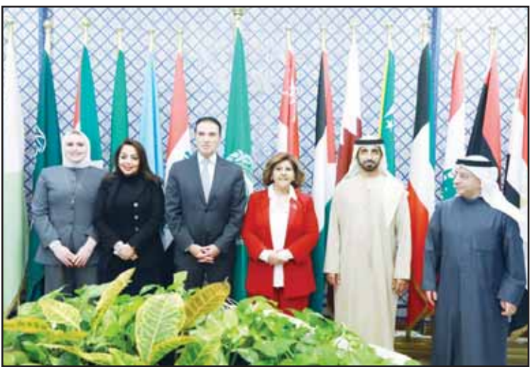
Participants in the 57th session of the Arab Permanent Committee for Human Rights, chaired by Kuwait.