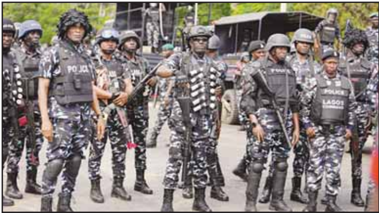
Nigeria police officers stand guard during a candlelight procession in honour of all protesters killed nationwide at the recently economic hardship protest, in Lagos, Nigeria on Aug 9, 2024.