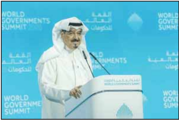
His Highness the Prime Minister Sheikh Ahmad Abdullah Al-Ahmad Al-Sabah delivers a speech at the World Governments Summit 2026 held in Dubai.

His Highness said that shaping the future of governments is important, but such visions must be actionable, stressing that the real challenge lies not in formulating aspirations, but in transforming them into decisions, policies and tangible results that directly impact people's daily lives.