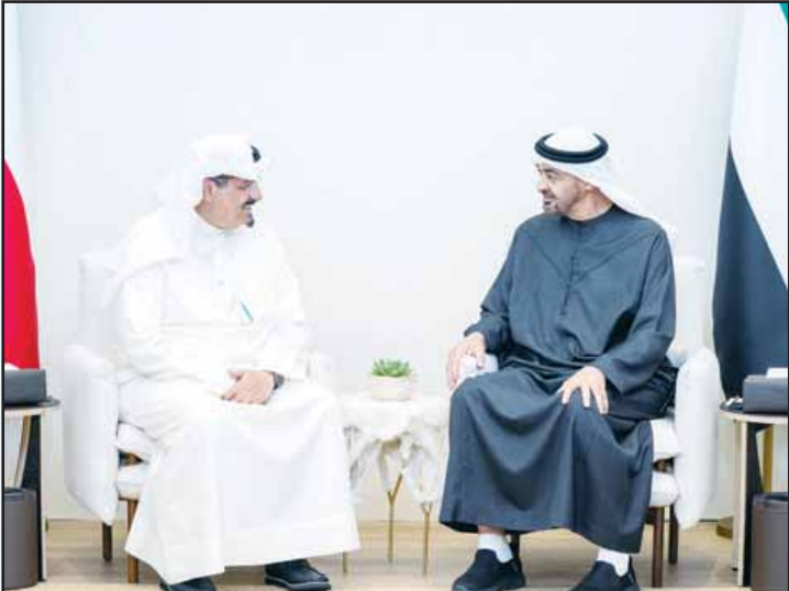
President of the United Arab Emirates Sheikh Mohammad bin Zayed Al-Nahyan received His Highness the Prime Minister Sheikh Ahmad Abdullah Al-Ahmad Al-Sabah.

DUBAI, Feb 4, (KUNA): President of the United Arab Emirates Sheikh Mohammad bin Zayed Al-Nahyan received on Tuesday His Highness the Prime Minister Sheikh Ahmad Abdullah Al-Ahmad Al-Sabah, on the sidelines of the World Governments Summit currently held in Dubai.