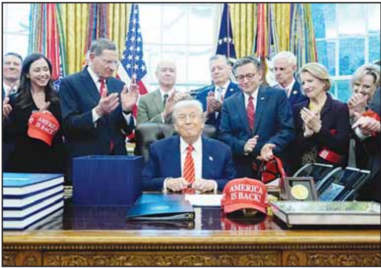
US President Donald Trump smiles after signing a spending bill that ends a partial shutdown of the federal government in the Oval Office of the White House, on Feb 3, in Washington. (AP)

WASHINGTON, Feb 4, (AP): US President Donald Trump signed a roughly $1.2 trillion government funding bill Tuesday that ends the partial federal shutdown that began over the weekend and sets the stage for an intense debate in Congress over Homeland Security funding. The president moved quickly to sign the bill after the House approved it with a 217-214 vote. “This bill is a great victory for the American people,” Trump said. The vote Tuesday wrapped up congressional work on 11 annual appropriations bills that fund government agencies and programs through Sept. 30. Passage of the legislation marked the end point for one funding fight, but the start of another. That’s because the package only funds the Department of Homeland Security for two weeks, through Feb 13, at the behest of Democrats who are demanding more restrictions on immigration enforcement af-