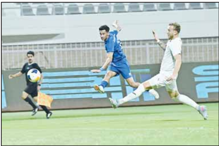
A file photo of players in action.

KUWAIT CITY, Feb 4: The Zain Premier League resumes today following a short break for the Super Cup, won by Qadsia. The 13th round kicks off with two exciting matches: Al-Shabab hosts neighbor Al-Fahaheel at 4:40 p.m., while Al-Nasr travels to face Al-Tadamon at 7:05 p.m. Upcoming fixtures include a crowd-pulling clash between Qadsia and Kuwait Club in Hawally tomorrow, Al-Arabi vs. Kazma the following day, and Al-Salmiya vs. Al-Jahra, also tomorrow. Fifth-placed Al-Fahaheel (17 points) enters the game with multiple objectives: to challenge Kazma and Qadsia for third place and to avenge their 1-0 first-leg defeat to Al-Shabab. A loss could see Al-Fahaheel drop in the standings, especially with Al-Salmiya, equal on points, set to face Al-Jahra, eighth in the table. Meanwhile, seventh-placed Al-Shabab (14 points) seeks a win to overcome recent setbacks. The team drew 1-1 with Al-Nasr last round and