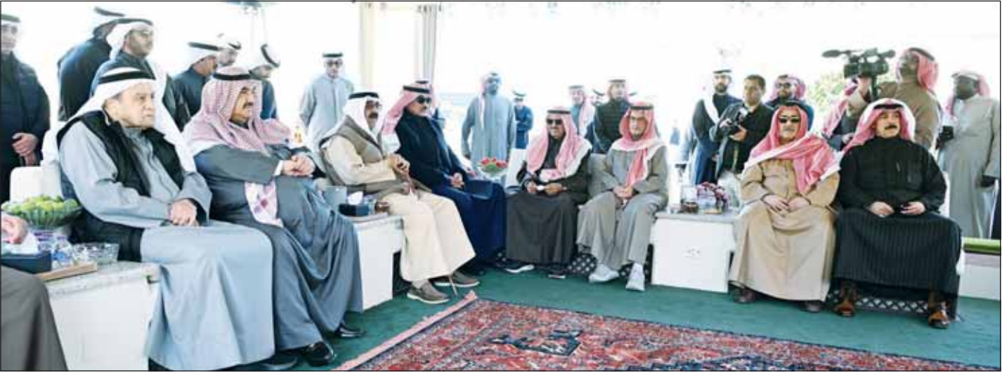
His Highness the Amir Sheikh Meshal Al-Ahmad, His Highness the Crown Prince Sheikh Sabah Al-Khaled, His Highness Sheikh Nasser Al-Mohammed, and Sheikhs Ali Al-Khalifa, Duaij Al-Malik, Ali Jaber Al-Ali, and Ali Al-Yousef