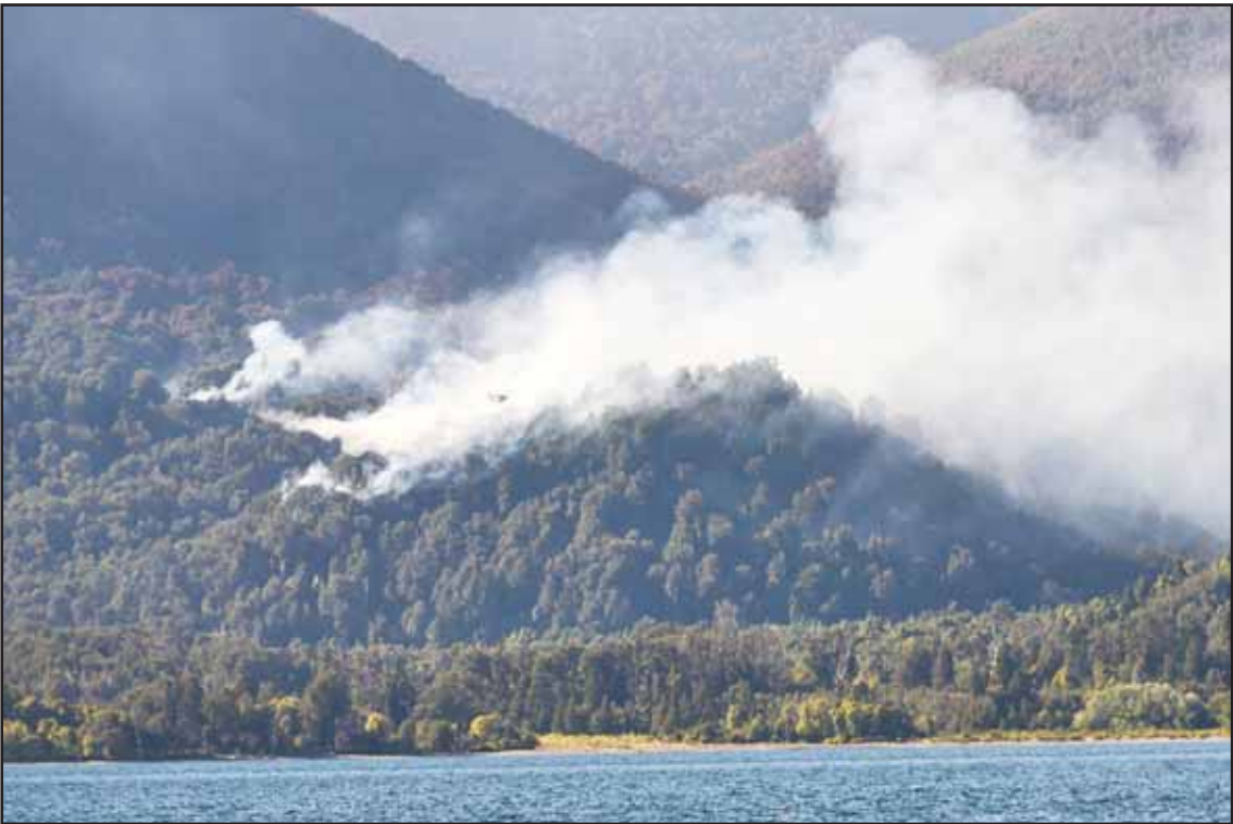
Wildfires burn in Los Alerces National Park in Argentina on Jan 31.

escalating fighting in South Sudan's Jonglei state, which is pushing one of the country's most fragile regions toward collapse and raising fears of a slide back into full-scale war after an eight-year peace deal, the United Nations and aid groups said.