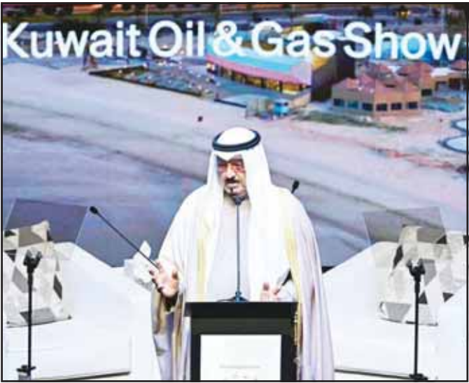
His Highness the Prime Minister Sheikh Ahmad Al-Abdullah Al-Sabah at the Kuwait Oil and Gas Show Conference.

Tuesday. In global markets, the price of Brent crude dropped USD 3.54 to reach USD 67.09 per barrel, while the West Texas Intermediate went down USD 2.23 to reach USD 62.99 pb.