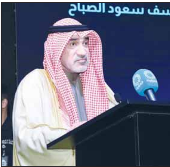
Kuwait's First Deputy Prime Minister and Minister of Interior Sheikh Fahad Yousef Saud Al-Sabah delivers his speech at the opening of the forum.