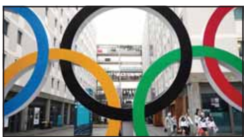
Athletes from France walk inside the Olympic Village ahead of the 2026 Winter Olympics, in Milan, Italy. — See Page 14