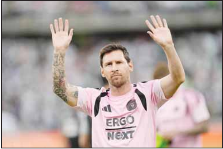
Inter Miami’s Lionel Messi acknowledges fans before the start of an international friendly soccer match against Colombia’s Atletico Nacional in Medellin, Colombia.

Brazil manager Carlo Ancelotti said Monday he is close to finalizing his squad