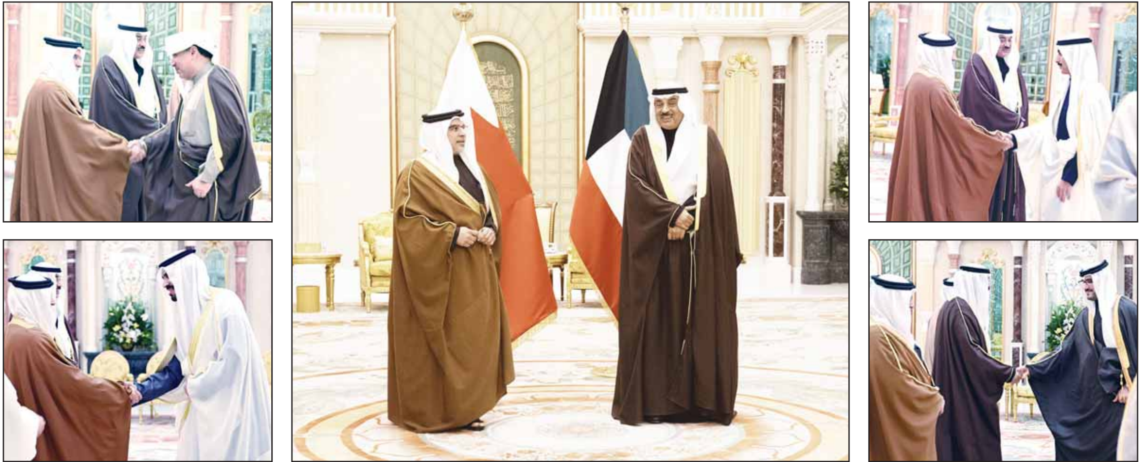
His Highness the Crown Prince Sheikh Sabah Khaled Al-Hamad Al-Sabah holds banquet in honor of Bahrain Crown Prince and Prime Minister Prince Salman bin Hamad Al-Khalifa.