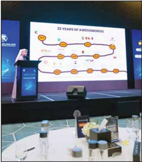
Abdullah Al-Mansour delivers a keynote address titled ‘From Governance to Sustainability,’ showcasing a timeline of talabat’s 22-year history and its evolution from a logistics marketplace to a pillar of the digital economy.

governance that provides protection, offers proactive solutions, and attracts investments is critical for the fruition of the synchronized efforts shared by all relevant parties; governance that