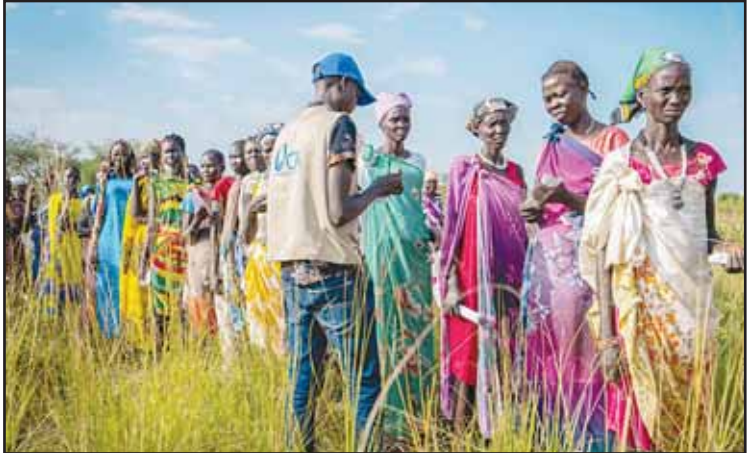
South Sudanese women line up for food rations at a World Food Programme (WFP) distribution point organized by Catholic Relief Services in Jonglei state, South Sudan on Nov 13, 2024. (AP)

JUBA, South Sudan, Feb 3, (AP): Humanitarian organizations in South Sudan said Monday that restricted access to the conflict-hit eastern state of Jonglei has left thousands of people in need of lifesaving medical care and food assistance at risk, as the United Nations raises concern over a growing number of displaced people. The International Rescue Committee's country director for South Sudan, Richard Orengo, said that "intensified fighting and the militarization of key areas have forced the suspension of services." Medical organization Doctors Without Borders, also known by its French name Médecins Sans Frontières, or MSF, said that the government has suspended all humanitarian flights, cutting off medical supplies, staff movement and emergency evacuations. At least 23 critically ill patients, including children and pregnant women, urgently require evacuation, MSF said. The World Food Program, a Rome-based UN agency, has warned that escalating violence threatens to cut off food assistance to hundreds of thousands of people, as nearly