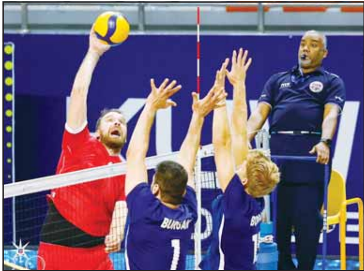
A file photo of Kuwait Club and Burqan players fighting for the ball.

The opening day features three matches: Al-Rayyan vs. Majis at 2:00 pm, Al-Ahli vs. Al-Wakrah at 4:00 pm, and Kuwait Club facing Shabab Al-