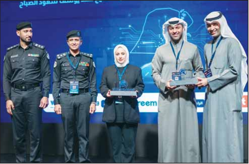
Partnership Group Portrait – Key participants and representatives from talabat and the Ministry of Interior pose with awards at the NFTSS forum held at the Four Seasons Hotel.