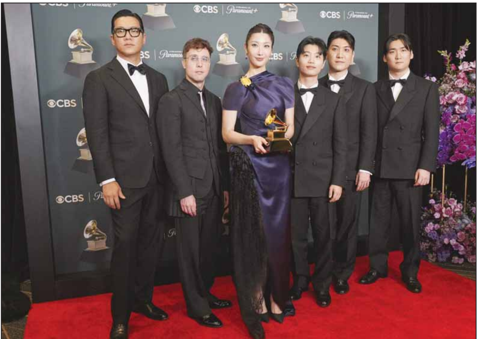
The team from 'KPop Demon Hunters' pose in the press room with the award for best song written for visual media for 'Golden' during the 68th annual Grammy Awards on Sunday, Feb. 1, in Los Angeles.