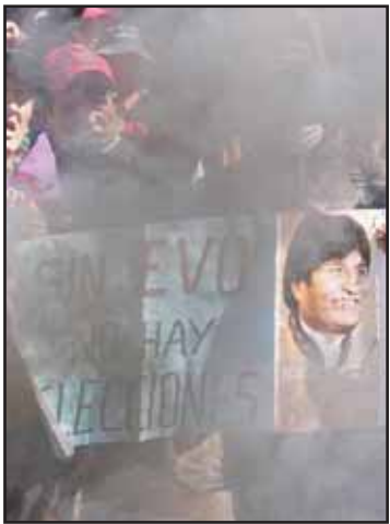
Supporters hold a sign with an image of former President Evo Morales and a message that reads in Spanish, 'Without Evo, there are no elections,' during a protest demanding he be allowed to compete in the upcoming presidential election, near the Supreme Electoral Tribunal in La Paz, Bolivia on May 29, 2025.