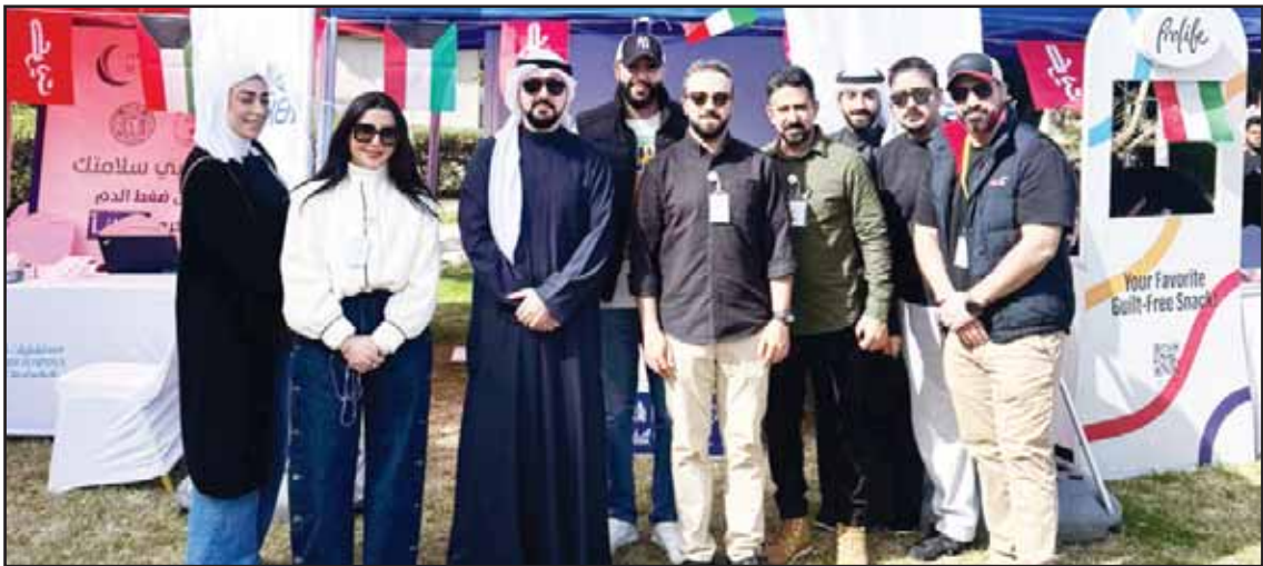
A group of bank employees during the event.