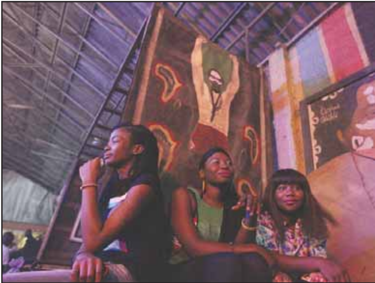
Women sit under portraits of Fela Anikulapo-Kuti at the New Afrika Shrine in Lagos, Nigeria, on Sunday, Oct. 21, 2012.

"Regardless of the contrast with what Fela represented and what the award