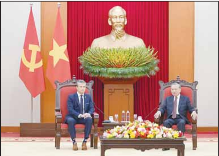
US Defense Secretary Pete Hegseth, (left), and General Secretary of Vietnam's Communist Party To Lam talk during a meeting in Hanoi, Vietnam on Nov 2, 2025.