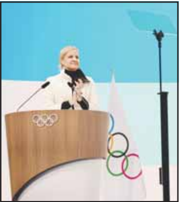
IOC President Kirsty Coventry gestures as she speaks during the opening of the IOC Session, ahead of the 2026 Winter Olympics, in Milan, Italy.

spread-out Winter Olympics ever, spanning two regions - Lombardy and Veneto - and the autonomous provinces of Trento and Bolzano. From Milan, Italy’s cultural and financial center, to the alpine town of Cortina d’Ampezzo, the Games will be staged across a wide range of settings with deep sporting traditions.