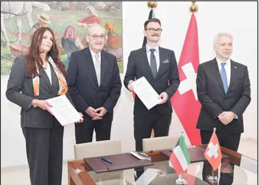
Swiss President Guy Parmelin says visit to Kuwait was historic and memorable.