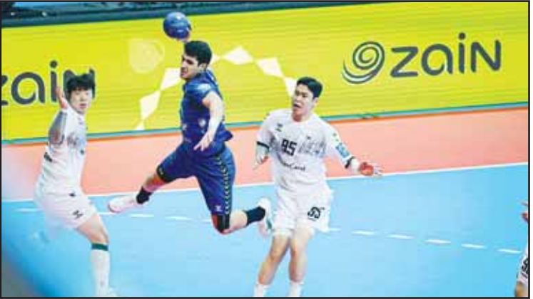
Zain is proud to have been part of this continental sporting event hosted on Kuwaiti soil.