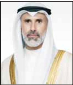
Sheikh Jarrah Jaber

The well-wishers include Qatari Prime Minister and Foreign Minister Sheikh Hamad bin Abdulrahman Al Thani, Saudi Foreign Minister Prince Faisal bin Farhan bin Abdullah Al-Saud, Bahraini Foreign Minister Dr. Abdulatif Al-Zayani, and Omani Foreign Minister Badr bin Hamad Al Busaidi, according to a statement from the Kuwaiti