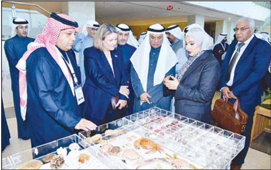
A glimpse of the tour of Minister Al-Jalal and the Australian Ambassador at the accompanying exhibition.