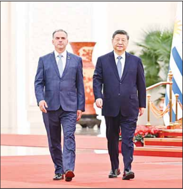
Chinese President Xi Jinping holds a welcome ceremony for President of the Oriental Republic of Uruguay Yamandu Orsi in the Northern Hall of the Great Hall of the People prior to their talks in Beijing, capital of China on Feb 3, 2026. Xi held talks with Orsi, who is on a state visit to China, at the Great Hall of the People in Beijing on Tuesday.