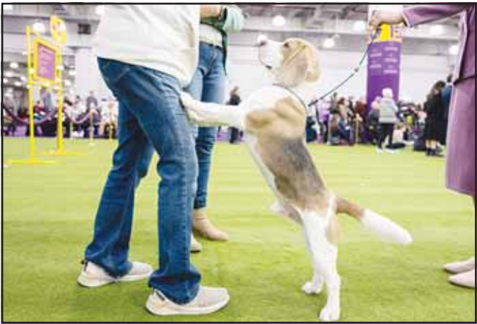
Wilbur the beagle, a blue triangle beagle canine actor known for his role in ‘The Rip,’ jumps onto his handler’s legs at the 150th Westminster Kennel Club Dog Show, Monday, Feb. 2, 2026, in New York.