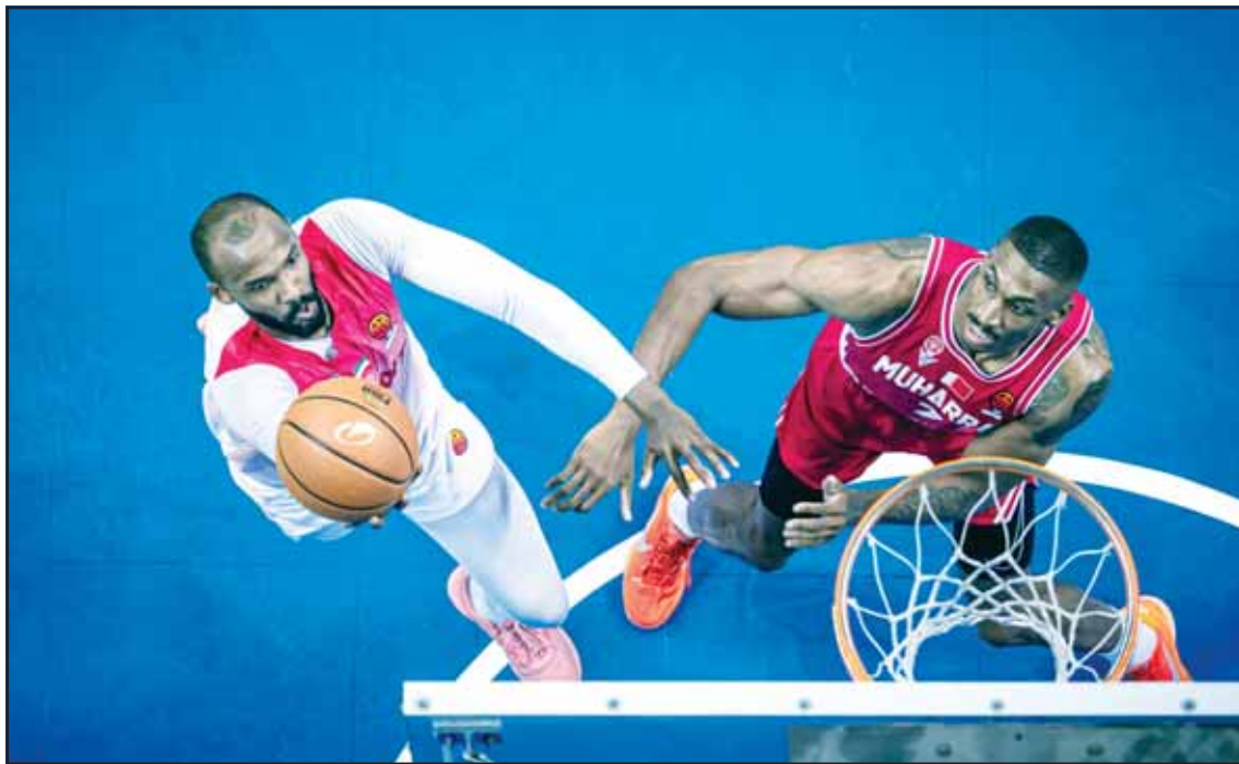
Kuwait Club player soars over an opponent to score.

The league follows a three-round format, with the top four teams advancing to the semifinals, played as best-of-three series.