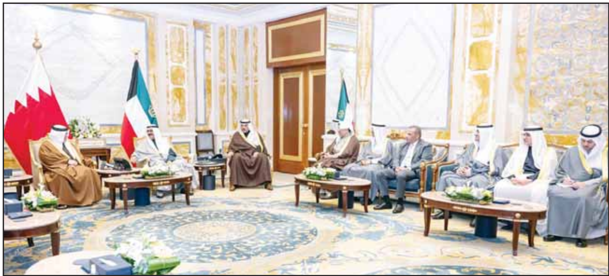
His Highness the Amir receives the Kingdom of Bahrain's Crown Prince and Prime Minister and the official delegation accompanying him, on the occasion of his official visit to the country.