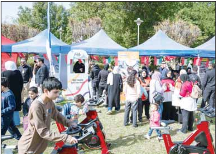
A large crowd attended the sports.