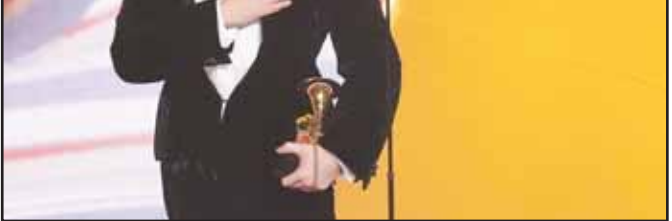
Bad Bunny accepts the award for album of the year for 'Debí Tirar Más Fotos' during the 68th annual Grammy Awards on Sunday, Feb. 1, 2026, in Los Angeles.

"I'm scared," Gloria Estefan said backstage after winning an award. "There are hundreds of children in detention centers. ... I don't recognize my country in this moment right now."