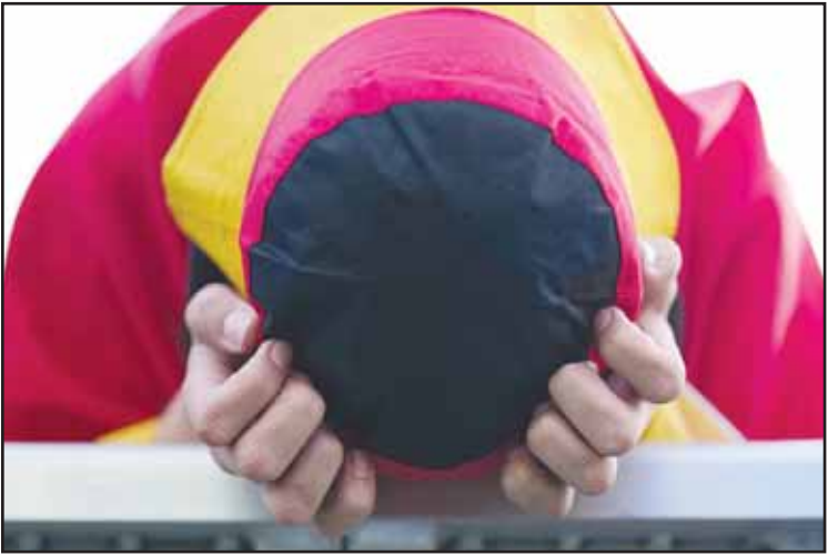
A German soccer fan reacts at a fan zone after a quarter final match between Germany and Spain at the Euro 2024 soccer tournament in Berlin, Germany, July 5, 2024.