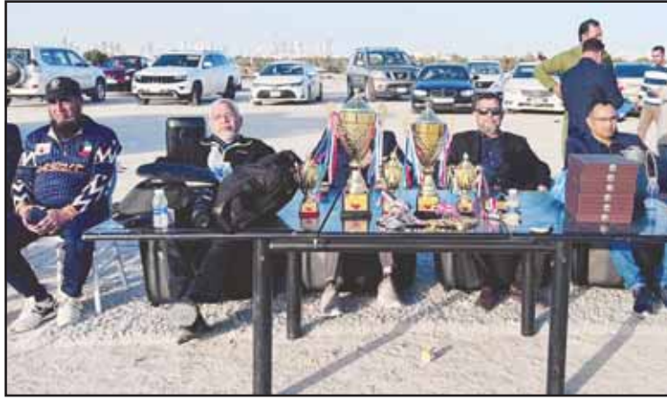
Top and above: Photos from the Kuwait Summer League Cricket Tournament.