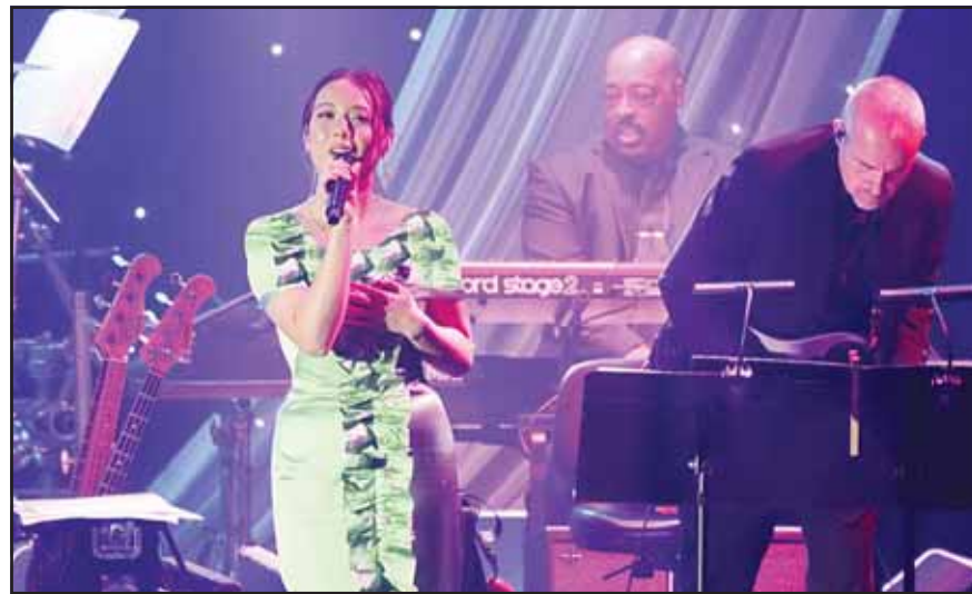
Laufer performs during the Pre-Grammy Gala.