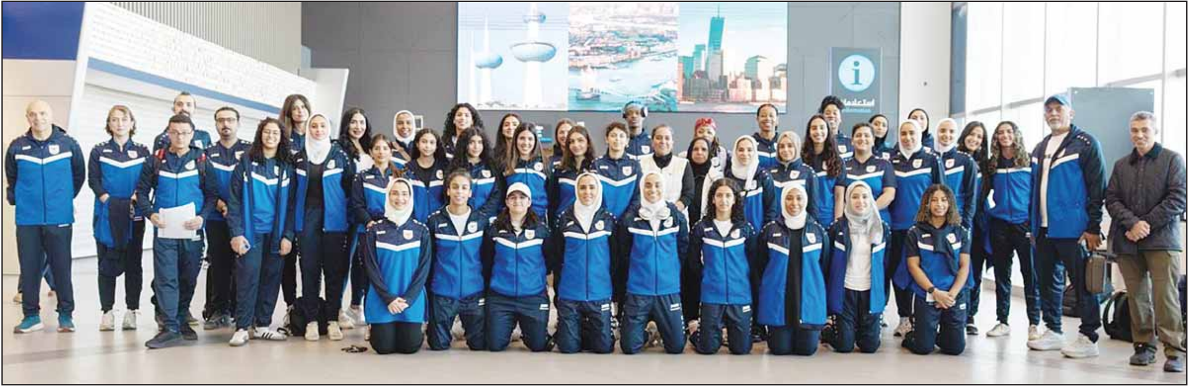
Kuwait delegation taking part in the 8th Arab Women's Club Games.

KUWAIT CITY, Feb 1: The Kuwait national team is taking part in the 8th Arab Women's Club Games, being held in the Emirate of Sharjah from February 2 to 12, with a delegation of 69 female athletes competing across nine different sports.