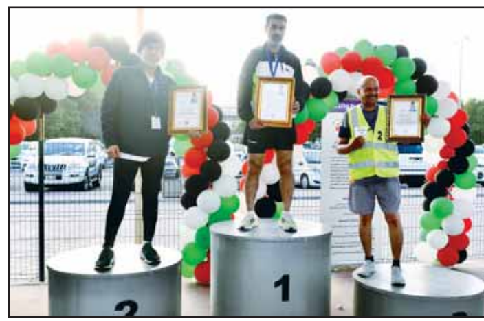
Winners among men at the podium.