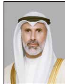
Sheikh Jarrah Jaber Al-Ahmad Al-Sabah, Minister of Foreign Affairs