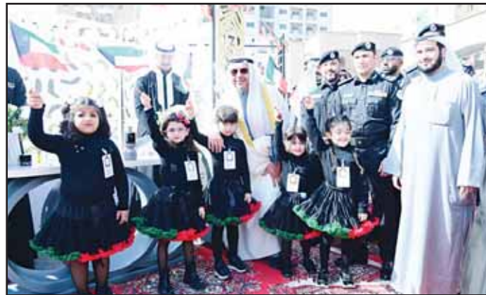
Sheikh Athbi Nasser Al-Athbi Al-Sabah poses with little revelers at the ceremony.