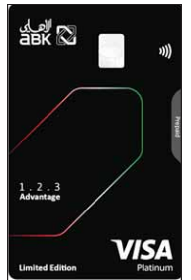
ABK Visa Platinum Advantage 1.2.3 Prepaid Card

For more information, customers may visit ABK's official website or contact the bank directly.