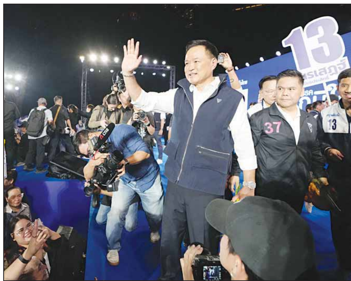
Thailand's Prime Minister and leader of Bhumjithai Party Anutin Charnvirakul, attends an election campaign, in Bangkok, Thailand on Jan 30.

Held at the Poipet International Border Checkpoint between Cambodia's Banteay Meanchey province and Thailand's Sa Kaeo province, the meeting was held between Cambodia's 5th Military Region and Thailand's 1st Army Area under the observation of the ASEAN Observer Team.