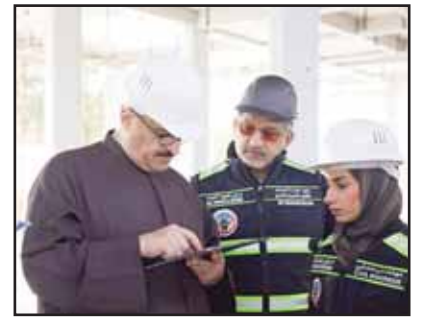
The Minister of Health is briefed on the latest developments in the project.

departments, such as emergency, general clinics, chronic disease clinics, dentistry, X-Ray, laboratory and pharmacy.