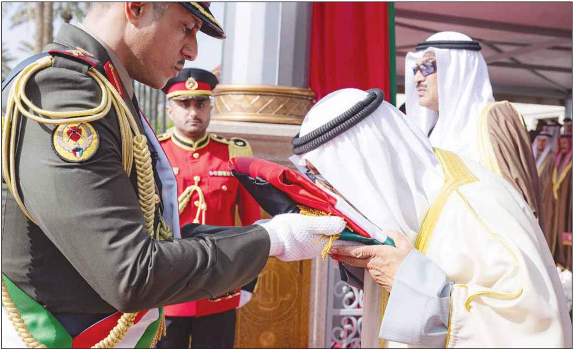
His Highness the Amir kisses the Kuwaiti flag in a powerful gesture of national pride and loyalty.

Flag-raising ceremonies are being held across Kuwait's six governorates amid festive atmospheres, accompanied by nationwide activities and celebrations. These events reflect on Kuwait's achievements at both regional and international levels while paying tribute to its independence and honoring the sacrifices made during the 1990 liberation, recognizing all who contributed to restoring the nation's freedom.