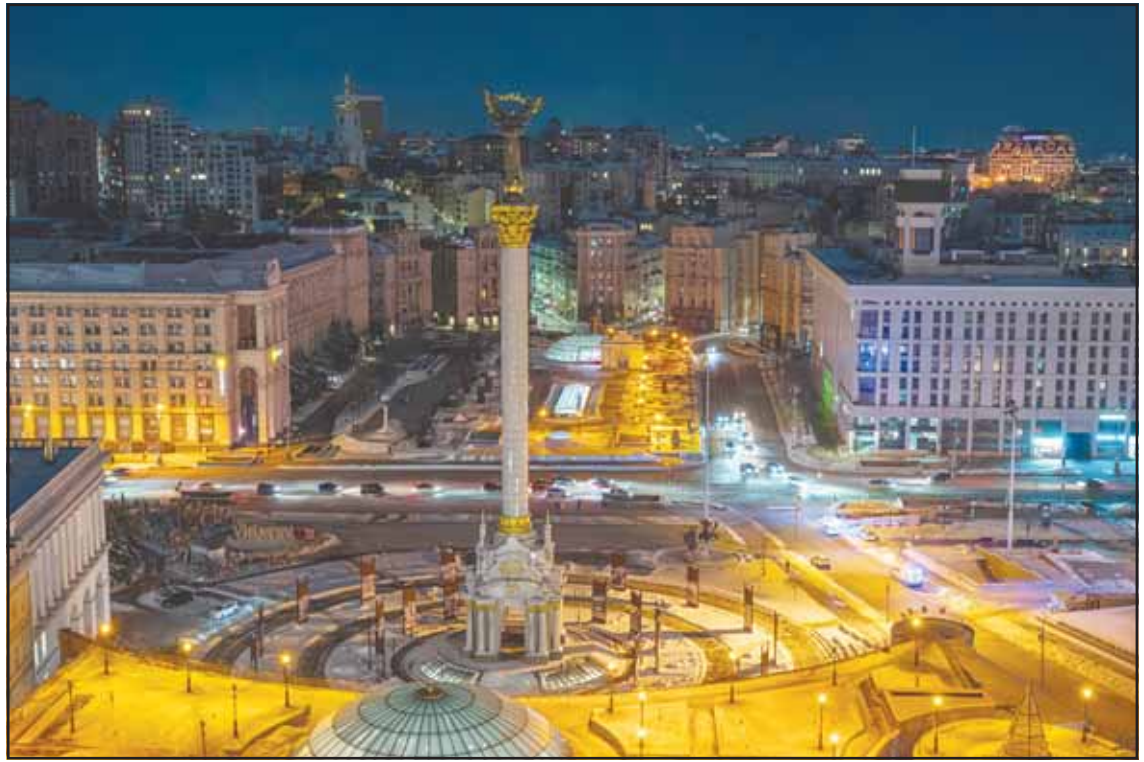
Central Independence square is seen as the city fights with blackout following Russia's air attacks on the country's energy sector in Kyiv, Ukraine on Jan 31. (AP)

Sen. Chris Coons, D-Del., said there "was unanimity" around core principles of enforcing a code of conduct for immigration officers and agents, ending "roving patrols" for immigration enforcement actions and coordinating with local law enforcement on immigration arrests. It helped that Trump himself was looking for ways to de-escalate in Minneapolis. "The world has seen the videos of those horrible abuses by DHS and rogue operations catching up innocent people, and there's a revulsion about it," said Sen. Tim Kaine, D-Va. "The White House is asking for a ladder off the ledge," he added. Republicans are also trying to promote their accomplishments in office as they ready for the November elections and the difficult task of retaining control of both chambers of Congress. But the prospect of a prolonged shutdown shifted attention away from their $4.5 trillion tax and spending cuts law, the centerpiece of their agenda. Republicans had hoped the beginning of this year's tax season on Monday would provide a political boost as voters begin to see larger tax refunds. Republicans are also mindful of the political damage from last year's shutdown, when they took a slightly larger portion of the blame from Americans than Democrats, according to polling from The Associated Press-NORC Center for Public Affairs Research.