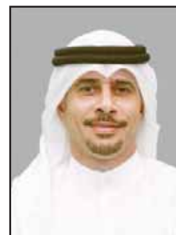
Dr. Tariq Hamad Nasser Al-Jalalma, Minister of State for Youth and Sports