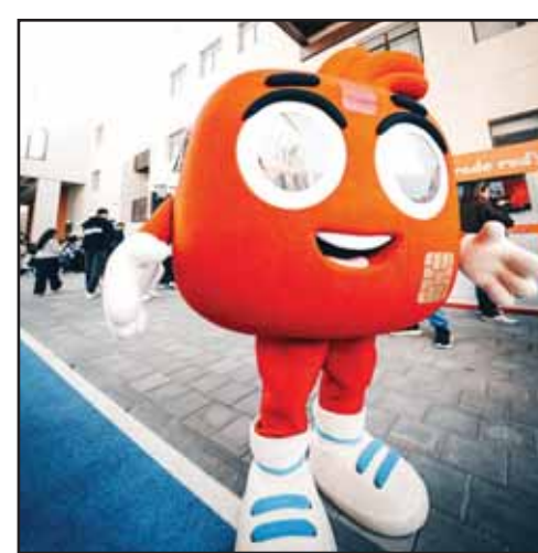
Neo's mascot attracting the attention of children and parents.

Educational institutions are considered strategic partners in advancing financial literacy, as they play a vital role in shaping values, habits, and decision-making skills among young individuals. Through its participation in the Al-Bayan Bilingual School Carnival, Gulf Bank