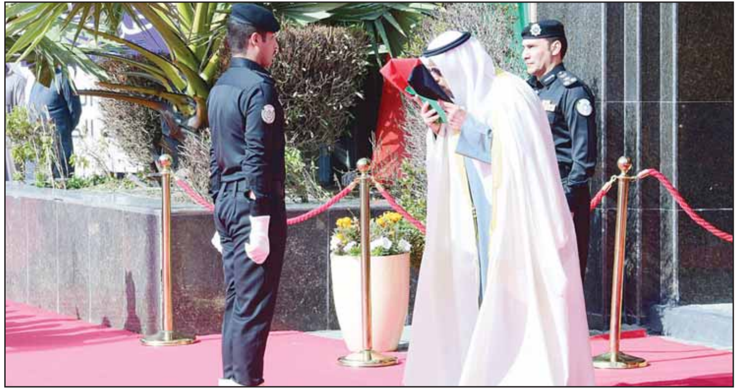
Farwaniya Governor Sheikh Athbi Nasser Al-Athbi Al-Sabah kisses the national flag before hoisting it.