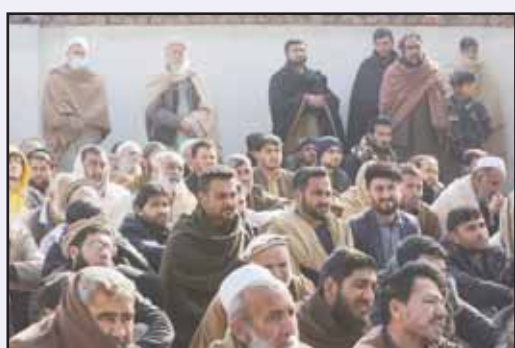
Men gather during a funeral procession for victims of a house collapse in Jalalabad, Afghanistan on Jan 29.

2 armed rebels killed in India: Indian security forces killed at least two armed rebels in an encounter that took place in the country's central state of Chhattisgarh on Thursday.