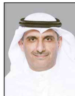
Abdulaziz Nasser Abdulaziz Al-Marzoug, Minister of State for Economic Affairs and Investment