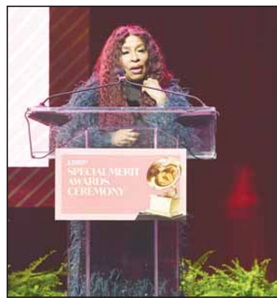
Chaka Khan accepts the lifetime achievement award during the Recording Academy's Special Merit Awards on Saturday, Jan. 31, 2026, at the Wilshire Ebell Theatre in Los Angeles.

"Thank you for bringing our father here," Femi Kuti said. "It's so important for us, it's so important for Africa, it's so