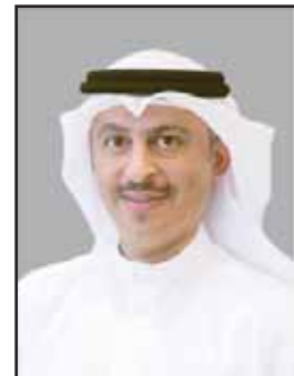
Osama Khaled Abdullah Boodai, Minister of Commerce and Industry