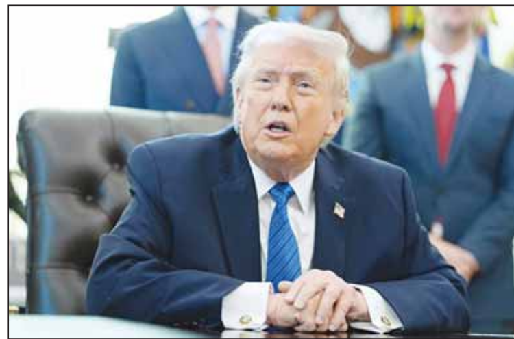
US President Donald Trump speaks during an event in the Oval Office of the White House on Jan 30, in Washington. (AP)

WASHINGTON, Feb 1, (AP): US President Donald Trump moved quickly this week to negotiate with Democrats to try and avert a lengthy government shutdown over Department of Homeland Security funding, a sharp departure from last year's record standoff, when he refused to budge for weeks. Some Republicans are frustrated with the deal, raising the possibility of a prolonged shutdown fight when the House returns Monday to vote on the funding package. But Trump's sway over the GOP remains considerable, and he has made his position clear at a moment of mounting political strain. "The only thing that can slow our country down is another long and damaging government shutdown," Trump wrote on social media late Thursday. The urgency marked a clear shift from Trump's posture during the 43-day shutdown late last year, when he publicly antagonized Democratic leaders and his team mocked them on social media. This time, with anger rising over shootings in Minneapolis and the GOP's midterm messaging on tax cuts drowned out by controversy, Trump acted quickly to make a deal with Senate Democratic leader Chuck Schumer of New York. "Trump and the Republicans know that this is an issue where they're on the wrong side of the American people and it really matters," Schumer told reporters Friday after Senate passage of the government funding deal.