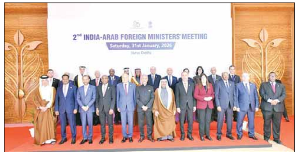
Arab countries' foreign ministers who took part in the meeting in New Delhi.

It currently covers energy, environment, agriculture, tourism, human resource development,