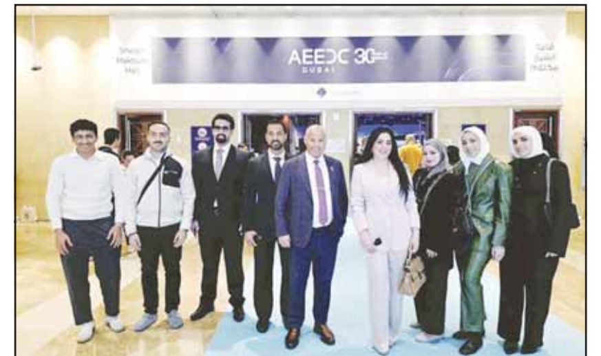
Kuwait University dentistry students pose with faculty members at AEEDEC Dubai.

It emphasized that these measures are part of enhancing digital transformation and facilitating students' access to their academic information, thereby, supporting the smooth operation of the educational process and improving services.