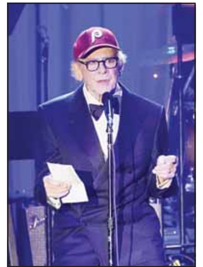
Art Garfunkel speaks during the Pre-Grammy Gala.