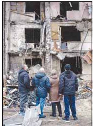
People look at the damage following a rocket attack the city of Kyiv, Ukraine, Feb. 25, 2022. (AP)

KYIV, Ukraine, Feb 1, (AP): The next round of peace talks between Russian and Ukrainian delegations will take place on Wednesday and Thursday, Ukrainian President Volodymyr Zelenskyy announced on Sunday. Envoys from Russia, Ukraine and the US had been expected to meet that day in Abu Dhabi, to continue negotiations aimed at ending Moscow's all-out invasion of its neighbor. "We have just had a report from our negotiating team. The dates for the next trilateral meetings have been set: Feb 4 and 5 in Abu Dhabi. Ukraine is ready for substantive talks, and we are interested in an outcome that will bring us closer to a real and dignified end to the war," Zelenskyy said in a Telegram post. There was no immediate comment from U.S. or Russian officials. On Saturday afternoon, top Russian envoy Kirill Dmitriev said he had held a "constructive meeting with the U.S. peacemaking delegation" in Florida. Officials have so far revealed few details of the talks in Abu Dhabi, which are part of a yearlong effort by the Trump administration to steer the sides toward a peace deal and end almost four years of all-out war. While Ukrainian and Russian officials have agreed in principle with Washington's calls for a compromise,