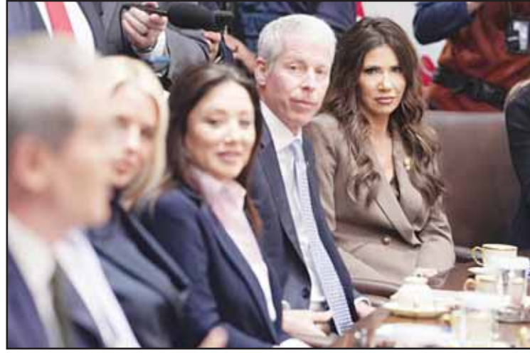
From left: Treasury Secretary Scott Bessent speaks as Attorney General Pam Bondi, Labor Secretary Lori Chavez-DeRemer, Energy Secretary Chris Wright, and Homeland Security Secretary Kristi Noem listen during a cabinet meeting at the White House on Jan 29 in Washington.

Later Saturday night, Trump said to reporters as he flew to Florida for the weekend that he felt Democratic cities are "always complaining." "If they want help, they have to ask for it. Because if we go in, all they do is complain," Trump said. He predicted that those cities would need help, but said if the leaders of those cities seek it from the federal government, "They have to say, 'Please.'" The Trump administration has already deployed the National Guard, or federal law enforcement officials, in a number of Democratic areas, including Washington, Los Angeles, Chicago and Portland, Oregon. But Saturday's order comes as opposition to such tactics has grown, particularly in Minnesota's Twin Cities region. Trump said Saturday night that protesters who "do anything bad" to immigration officers and other federal law enforcement, "will have to suffer" and "will get taken care of in at least an equal way." "You see it, the way they treat our people. And I said, you're allowed, if somebody does that, you can do some-