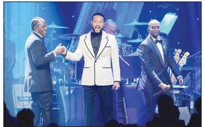
Pusha T, (from left), John Legend, and Malice on stage during the Pre-Grammy Gala on Saturday, Jan. 31, 2026, at the Beverly Hilton Hotel in Beverly Hills, Calif.