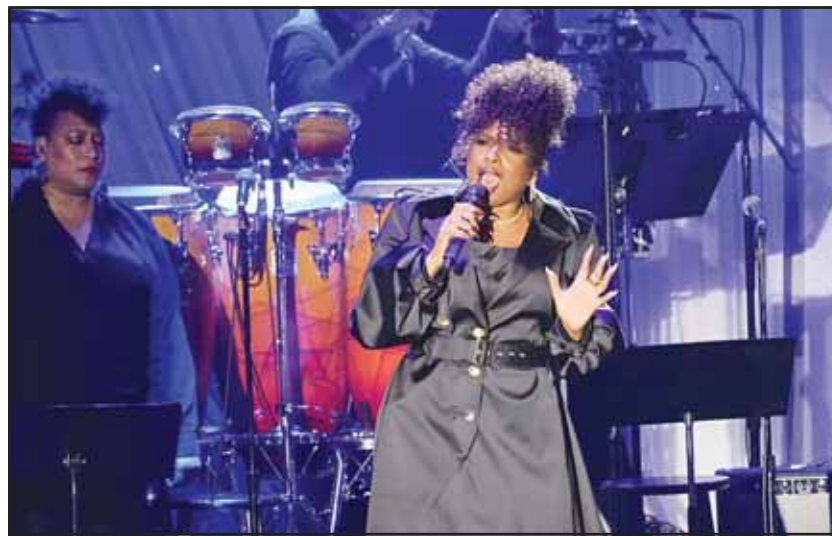
Jennifer Hudson performs during the Pre-Grammy Gala on Saturday, Jan. 31, 2026, at the Beverly Hilton Hotel in Beverly Hills, Calif.