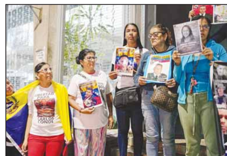
Relatives of detainees gather near El Helicoide, headquarters of Venezuela's intelligence service and a detention center, in Caracas, Venezuela on Jan 30, on the same day acting President Delcy Rodríguez announced an amnesty bill that could lead to the release of hundreds of prisoners, including opposition leaders, journalists and human rights activists detained for political reasons.

Rodríguez made her announcement before some of the officials that former