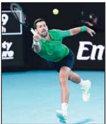
Novak Djokovic of Serbia plays a forehand return to Carlos Alcaraz of Spain during the men's singles final at the Australian Open tennis championship in Melbourne, Australia.

The 22-year-old Spaniard scrambled to retrieve shots that usually would be winners for Djokovic, and he kept up intense pressure on his 38-year-old rival. There were extended rallies where each player hit enough brilliant shots to usually win a game, with neither player willing to give an inch or