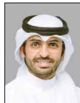
Abdullah Subaih Abdullah Buftain, Minister of Information and Culture