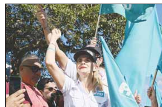
Costa Rican presidential candidate Laura Fernandez greets supporters during a campaign rally in San Jose, Costa Rica on Jan 24.

Twenty contenders are seeking the presidency, but Fernández is the only one who has consistently polled in