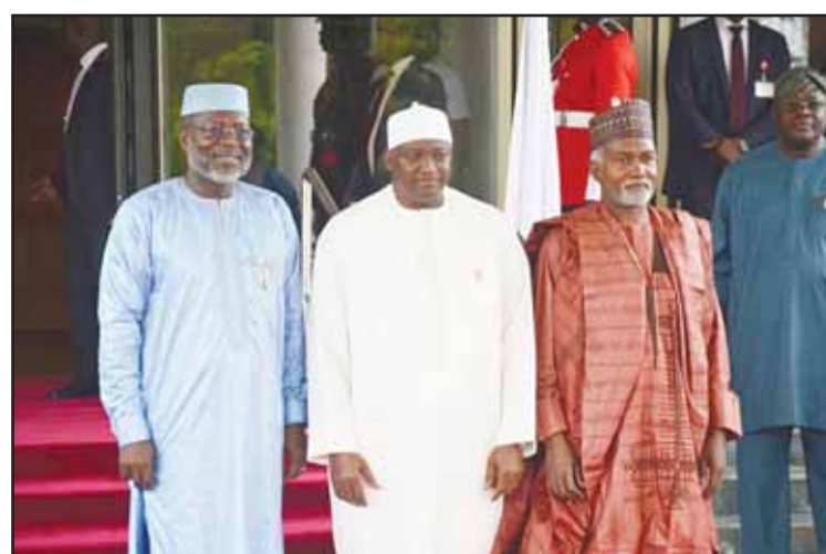
Omar Touray, president of the ECOWAS Commission, (left), Gambia's President Adama Barrow, (center) and Nigeria Minister of Foreign Affairs, Yusuf Tuggar pose for a photo, prior to the start of the ECOWAS meeting in Abuja, Nigeria on June 22, 2025.

Moreover, the West African nations also agreed to reinforce the harmoni-