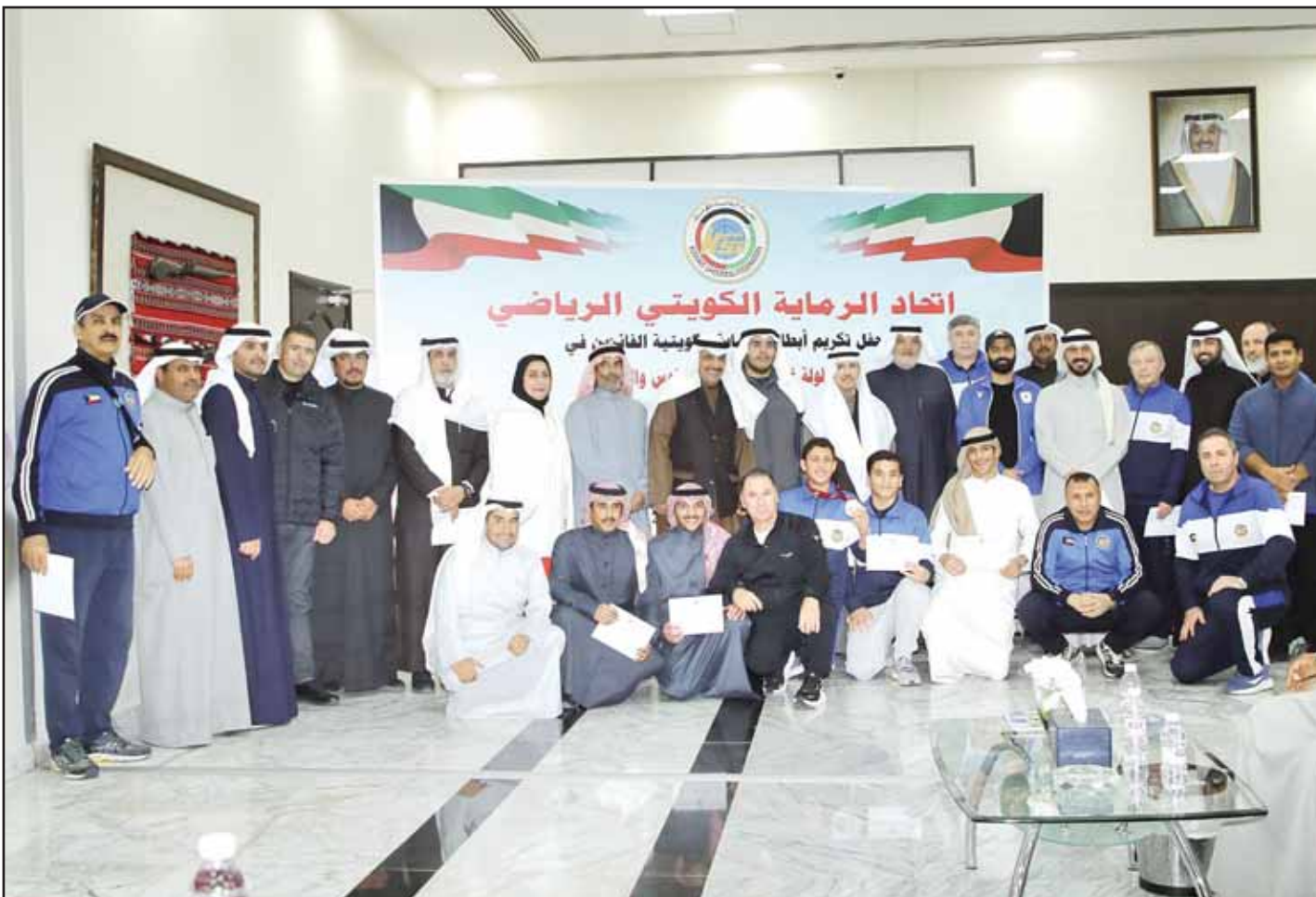
Officials pose with the honored shooters.