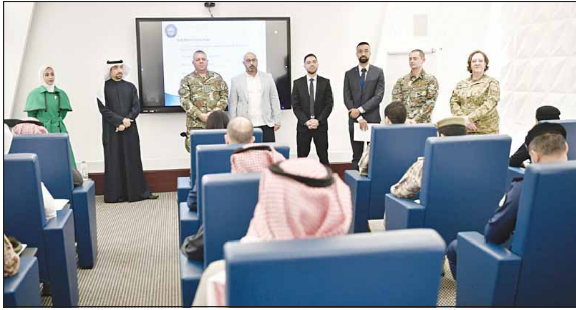
Participants of the training course.

Bubyan 18 12 Jahra 25 13 Failaka Island 21 12 Salmiyah 20 16 Ahmadi 19 10 Jal Aliyah 24 10 Nuwaisib 24 12 Salmiyah 26 07