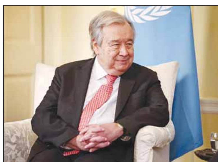
UN Secretary General António Guterres is welcomed by Britain's Prime Minister Keir Starmer to 10 Downing Street, London on Jan 16.

"Either all member states honor their obligations to pay in full and on time - or member states must fundamentally overhaul our financial rules to prevent an im-