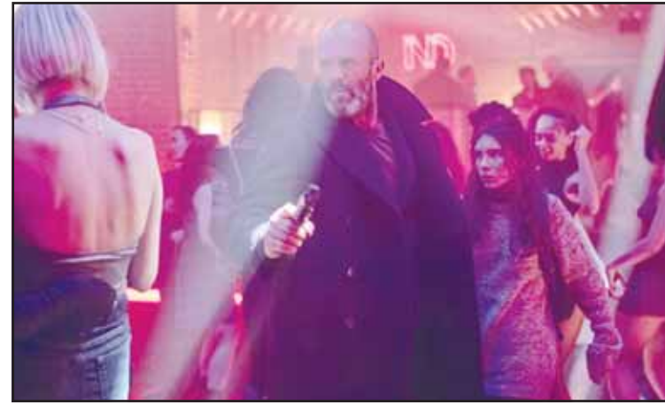
This image released by Black Bear shows Jason Statham, center, in a scene from 'Shelter.'

The swiftness with which the girl and Statham bond is quite sudden. "Just promise me you're not going to die," she wails in a line that only