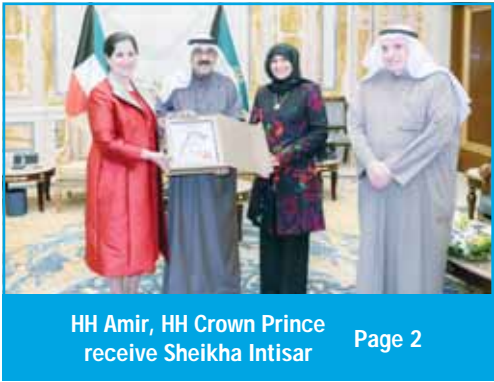
HH Amir, HH Crown Prince receive Sheikhha Intisar Page 2