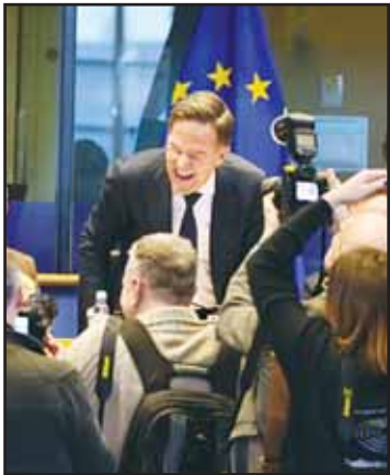
NATO Secretary General Mark Rutte arrives to address the Security and Defence Committee at the European Parliament in Brussels on Jan 26.

The NATO chief confirmed that the United States’ commitment to Article Five of the Alliance’s Charter, on collective defence, remains “total,” not-