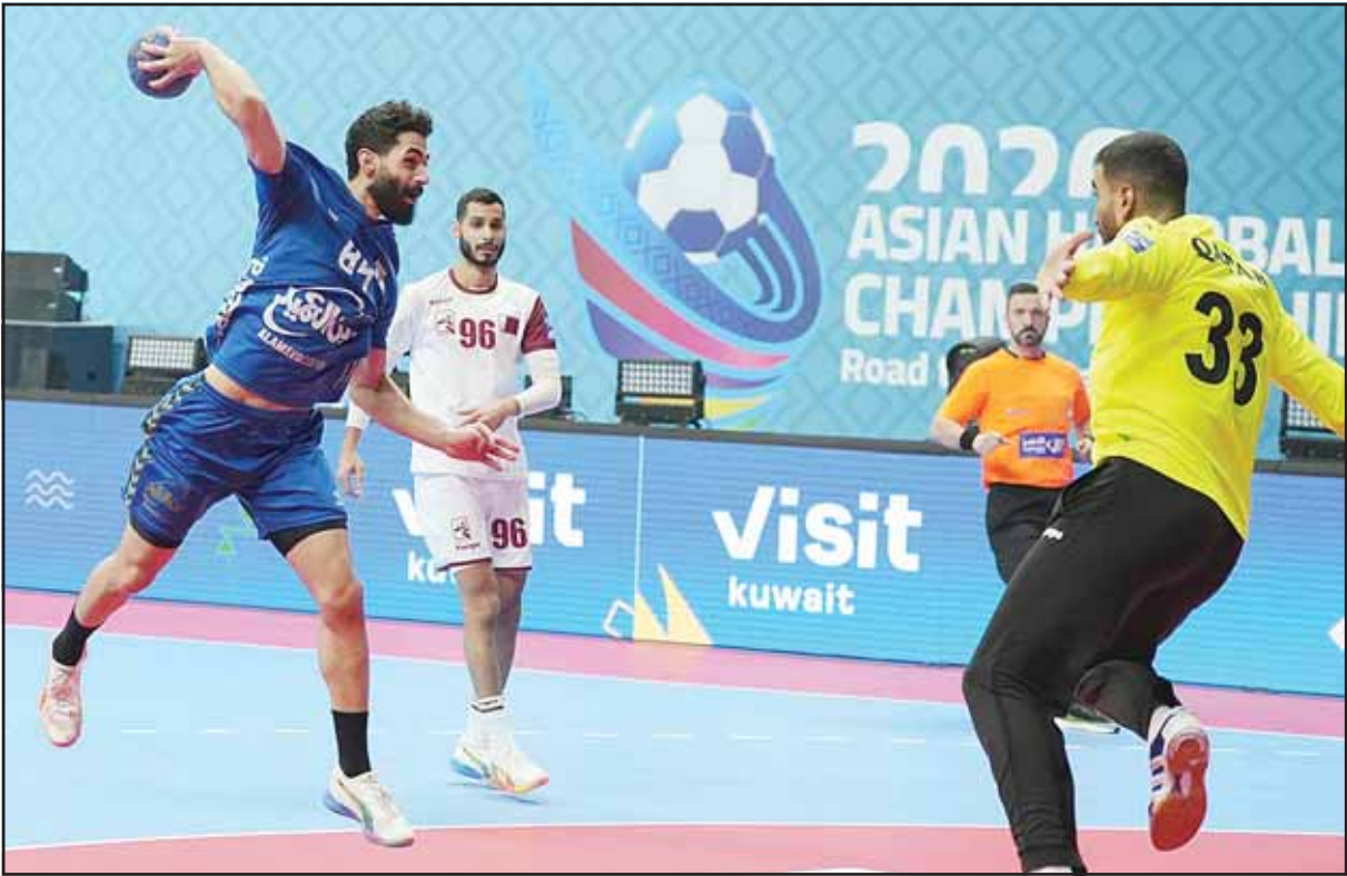
Kuwait player goes for a shot during the semifinal match between Kuwait and Qatar.