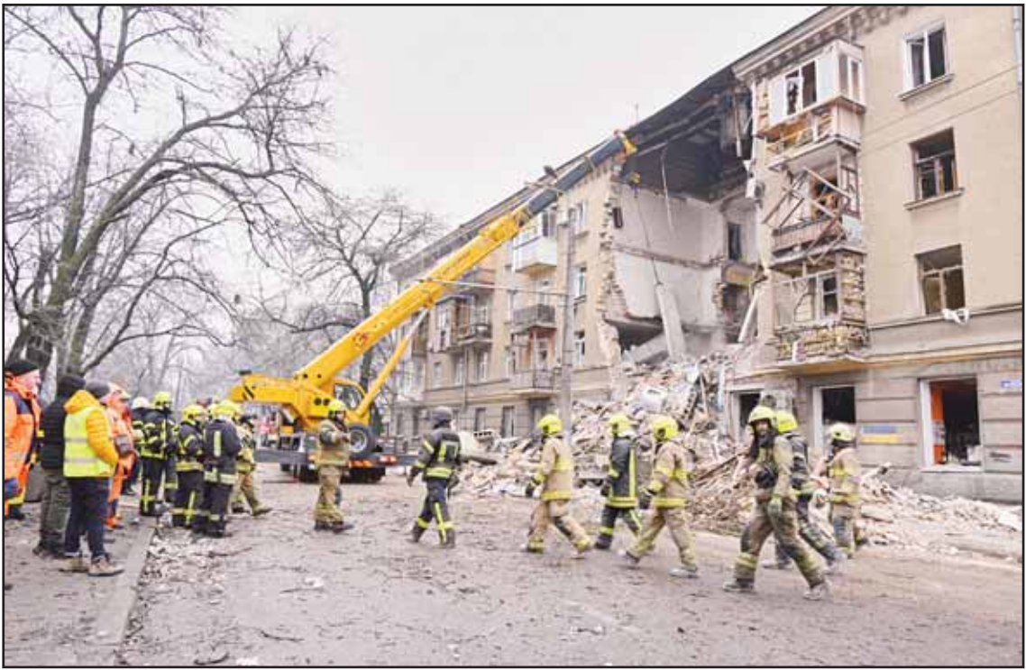
Rescue workers clear the rubble of a residential building which was damaged after a Russian strike in Odesa, Ukraine on Jan 27.

KYIV, Ukraine, Jan 27, A heavy Russian drone bombardment of Ukraine’s southern city of Odesa killed at least one person and injured 23, including two children and a pregnant woman, officials said Tuesday as Ukrainian President Volodymyr Zelenskyy called for faster US efforts to end Russia’s almost 4-year-old invasion of his country.