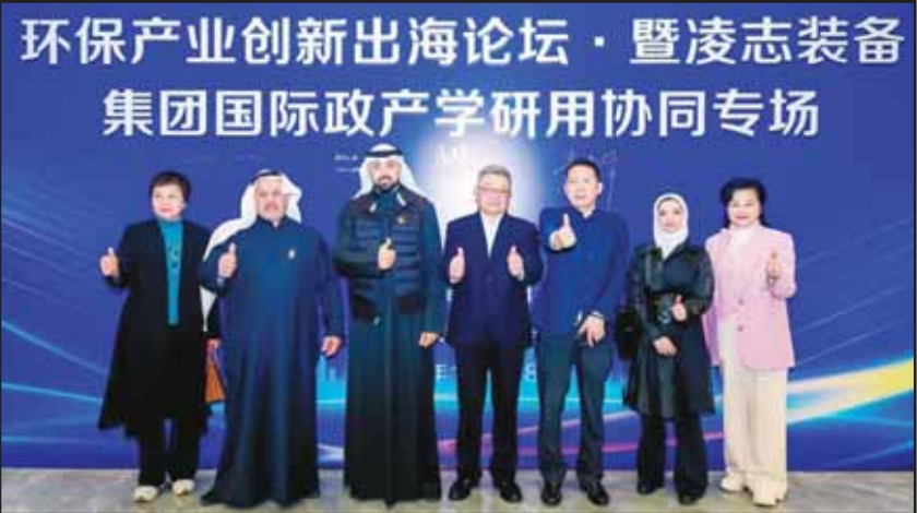
Group photo during the event.