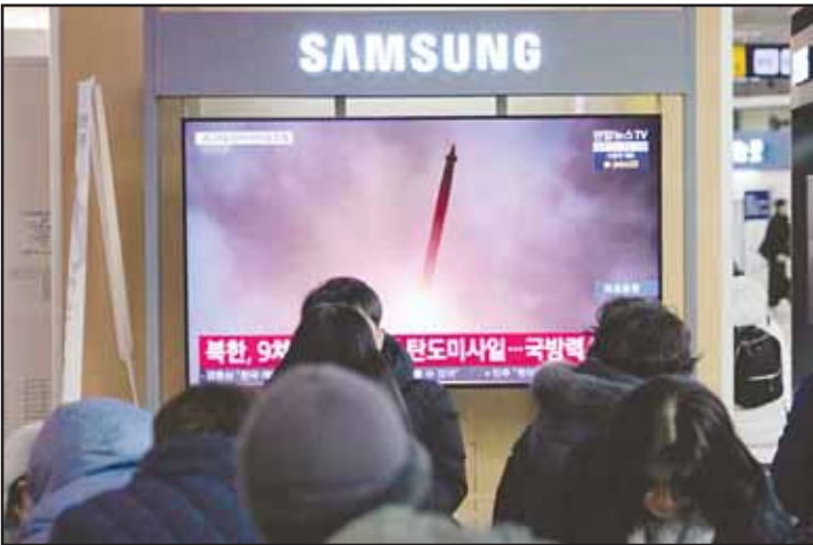
A TV screen shows a file image of North Korea's missile launch during a news program at Seoul Railway Station in Seoul, South Korea on Jan 27.

TOKYO: A Japanese court on Monday held North Korea responsible for the hu-