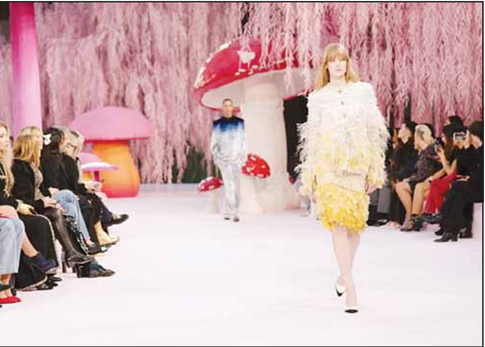
A model wears a creation as part of the Chanel Spring/Summer 2026 Haute Couture collection presented in Paris, Tuesday, Jan. 27.

took thousands of hours - including one with 65,000 handset feathers.