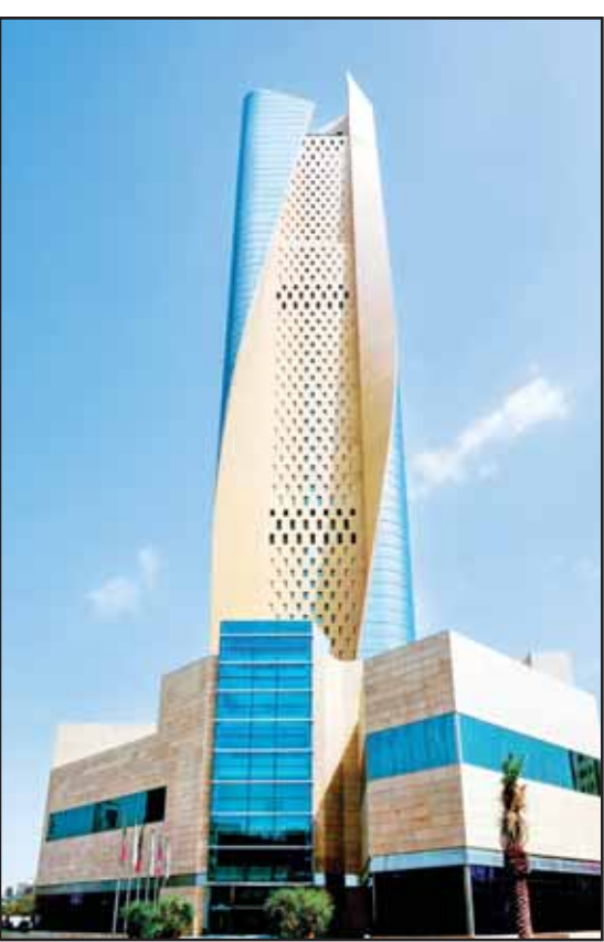
Al Hamra Business Tower

KUWAIT CITY, Jan 27: Al Hamra Real Estate Company announced the successful completion of a comprehensive and integrated maintenance project for the electrical systems at Al Hamra Business Tower, one of Kuwait’s most prominent architectural and commercial landmarks. This was carried out in close collaboration and direct coordination with the Ministry of Electricity, Water, and Renewable Energy. This project represents an exceptional engineering achievement, marking the first in-depth and comprehensive maintenance operation for the systems in partnership with the Ministry. It reflects the management’s commitment to the highest standards of safety, efficiency and operational sustainability.