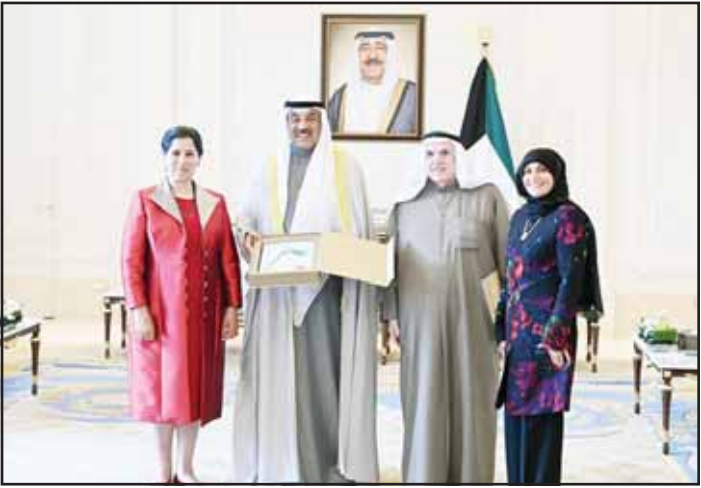
His Highness the Crown Prince Sheikh Sabah Khaled Al-Hamad Al-Sabah is presented a book titled 'Kuwait in 400 years.'