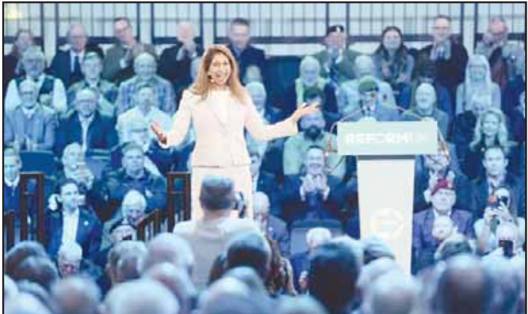
Former British home secretary Suella Braverman speaks during a Reform UK press conference in Westminster, central London on Jan 26.

The Conservatives have 116 seats and remain the official opposition to Prime Minister Keir Starmer’s Labour