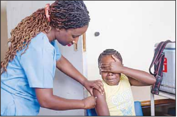
A 10-year-old girl reacts after receiving a free dose of the HPV vaccine at Budiro Polyclinic in Harare, Zimbabwe, Saturday, Jan. 17.