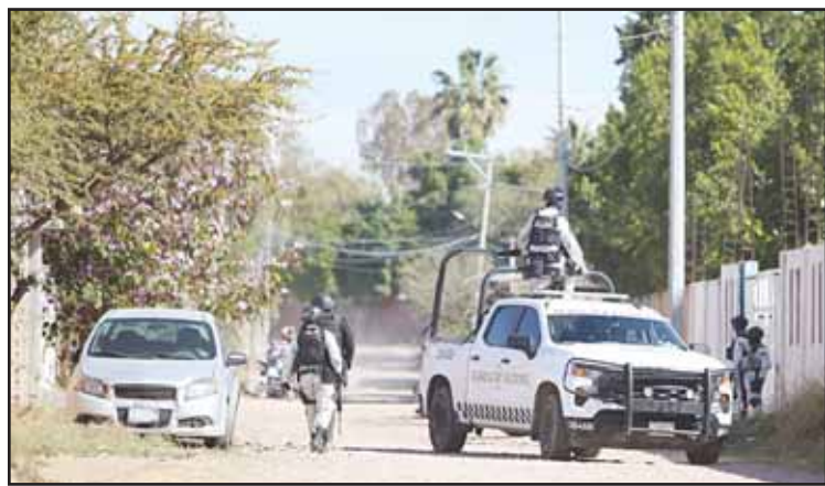
National Guards patrol near a soccer field the day after gunmen opened fire, killing and wounding people, in Salamanca, Mexico on Jan 26.

In a press conference on Monday, lawyers for the cartel members asserted they were denied due process because they were sent to the US without