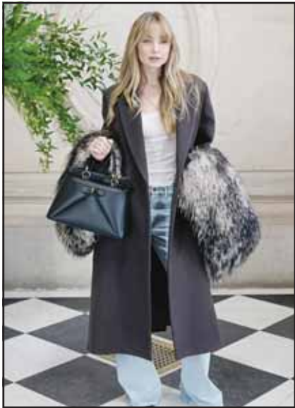
Jennifer Lawrence attends Christian Dior's Spring/Summer 2026 Haute Couture show in Paris.