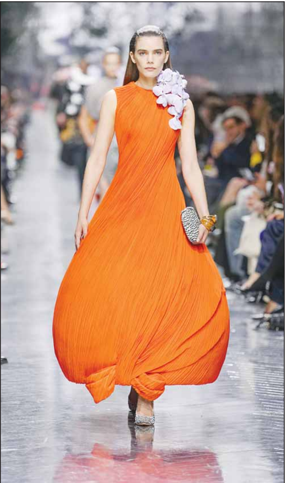
A model wears a creation as part of the Christian Dior Spring/Summer 2026 Haute Couture collection presented in Paris, Monday, Jan. 26.

Technique did the heavy lifting: bas-relief lace bouquets mounted on tulle, trompe l'oeil animal tails, and showpieces that reportedly