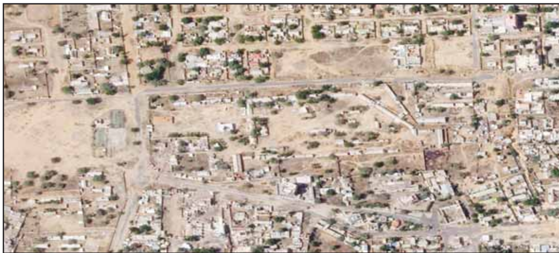
In this satellite photo provided by Planet Labs PBC, the area around the headquarters of the Sudanese military's 6th Division in el-Fasher, Sudan, is seen on Oct 26, 2025. (AP)

The massacre took place in the municipality of Salamanca , in the state with the highest number of homicides in the country. The region has been wracked by intense violence linked to the territorial dispute between the local Santa Rosa de Lima cartel - a violent group primarily dedicated to fuel theft and trafficking - and the Jalisco New Generation Cartel, CJNG.