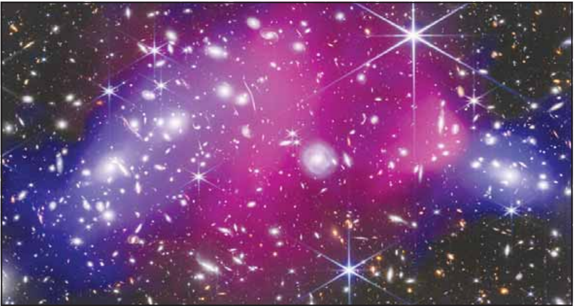
This NASA image shows two massive galaxy clusters previously captured by NASA’s James Webb Space Telescope and Chandra X-ray Observatory, with areas of possible dark matter in blue.