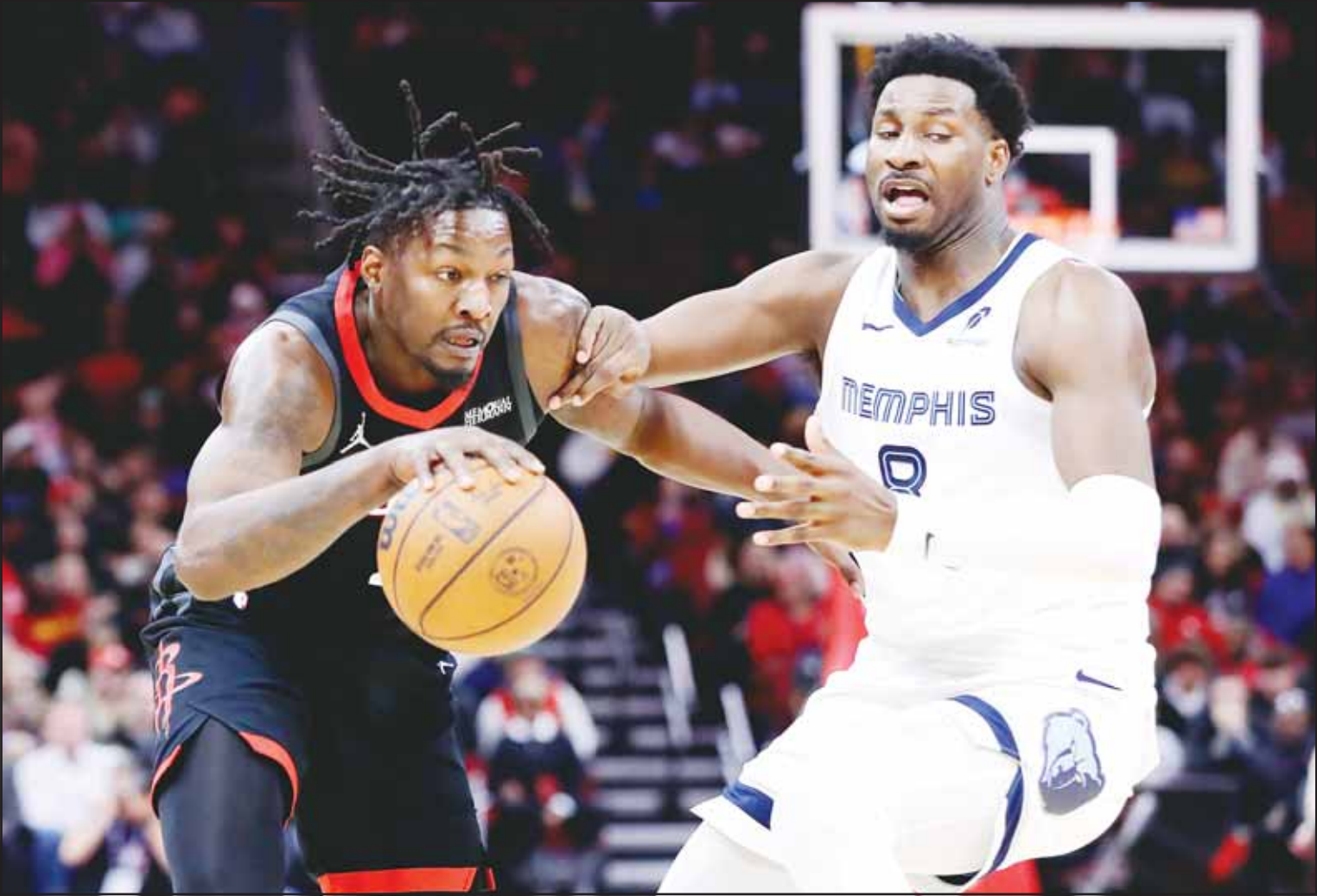
Houston Rockets forward Dorian Finney-Smith, left, drives around Memphis Grizzlies forward Jaren Jackson Jr., right, during the second half of an NBA basketball game in Houston.

In Houston, Alperen Sengun and Kevin Durant each scored 33 points as Houston Rockets broke open a close game in the fourth quarter and beat