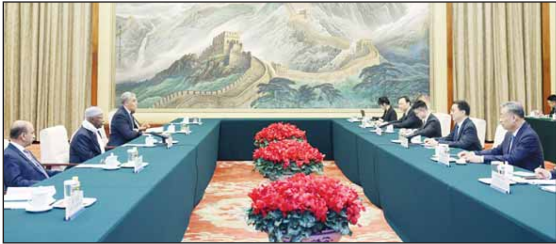
Chinese Vice President Han Zheng meets with Secretary-General of the Organization of Islamic Cooperation (OIC) Husein Ibrahim Taha in Beijing, capital of China on Jan 26.

The train was a single-car train bound for Nemuro from Kushiro, with 18 passengers and crew on board at the time, the report said.