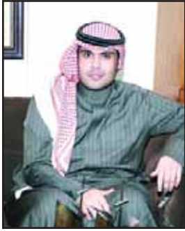
Fahad Al Jarba