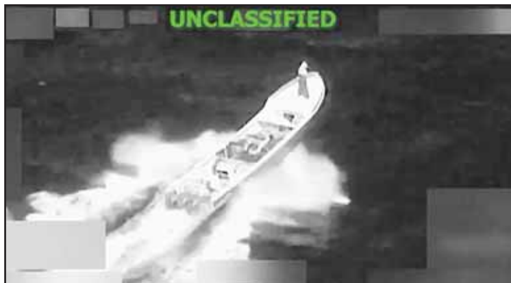
This image from video provided by US South Command, shows a vessel accused of trafficking drugs in the eastern Pacific Ocean shortly before it was destroyed by the US military, killing two and injuring one, on Jan 23.

President Donald Trump has said the US is in "armed conflict" with car-