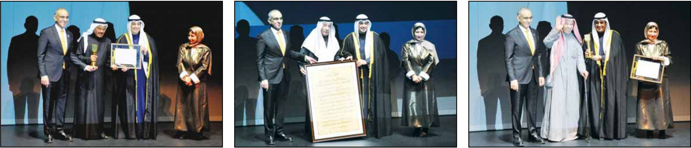
Minister of Information Abdulrahman Al-Mutairi, along with senior officials, honors winners of the Kuwait Appreciation and Creativity Awards during the 31st Qurain Cultural Festival.