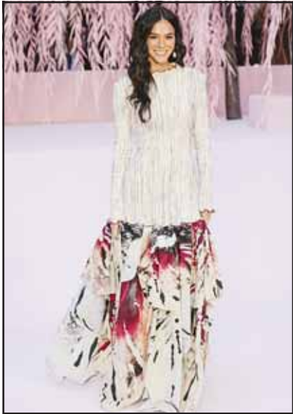
Bruna Marquezine at Chanel's Spring/Summer 2026 Haute Couture show in Paris.