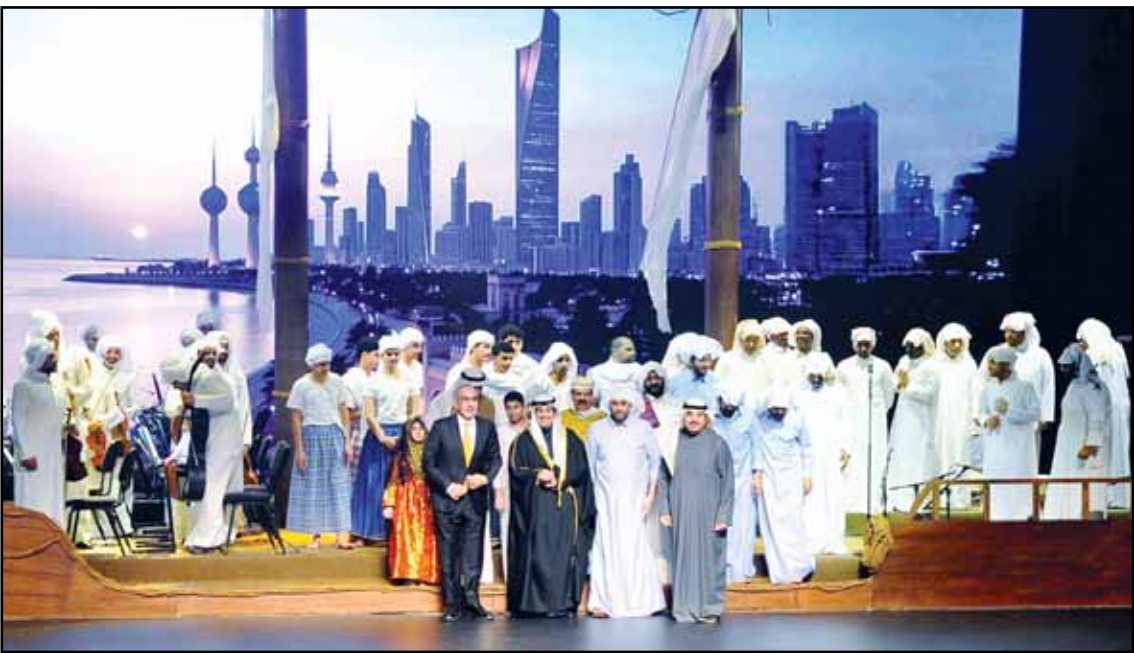
Minister of Information Abdulrahman Al-Mutairi poses with officials during the 31st Qurain Cultural Festival at Sheikh Jaber Al-Ahmad Cultural Centre.

KUWAIT CITY, Jan 27, (KUNA): Representative of His Highness the Prime Minister Sheikh Ahmad Abdullah Al-Ahmad Al-Sabah, Minister of Information, Culture and Minister of State for Youth Affairs Abdulrahman Al-Mutairi inaugurated on Monday the 31st edition of the Qurain Cultural Festival. In his address at the opening ceremony, held at the Sheikh Jaber Al-Ahmad Cultural Centre, Minister Al-Mutairi said this annual cultural festival embodies Kuwait’s pioneering role in embracing creativity and preserving cultural identity. With decades of success, the Qurain Cultural Festival has served as a broad space for art and knowledge—an annual meeting point where thought converges with creativity. Minister Al-Mutairi noted that the event reaffirms Kuwait’s belief that culture is a fundamental pillar in human development.” He noted that this edition coincides with the celebration of the Kuwait’s Appreciation Award and Creativity Award, both of which enjoy the gracious patronage of His Highness Kuwait’s Amir Sheikh Meshal Al-Ahmad Al-Jaber Al-Sabah. He added that the significance of the festival, which concludes on 11 February, is particularly pronounced this year as Kuwait celebrates its selection as the Arab Capital of Culture and Media 2025. This reflects a long history of cultural contributions and affirms Kuwait’s commitment to its enlightening role