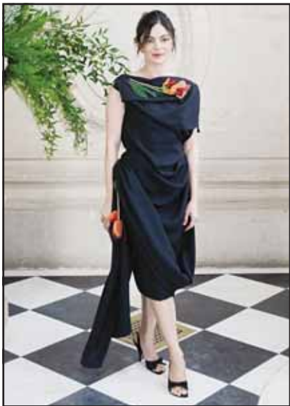
Monica Barbaro poses at Christian Dior's Spring/Summer 2026 show in Paris.