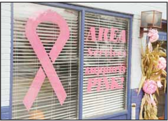
The AREA Services building in Shamokin, Pa., is decorated in pink ribbons and bras for Breast Cancer Awareness month, Oct. 4, 2012. (AP) to the cancer society. While mammograms are critical, especially for finding early, otherwise undetectable cancers, it’s important to notice breast changes between screenings or before you are

NEW YORK, Jan 27, (AP): What does it mean to have breast self-awareness? It’s a more general, flexible approach to breast cancer prevention that involves staying familiar with how your breasts look and feel. It goes along with other early detection measures like getting regular mammograms. Doctors suggest breast self-awareness as an alternative to self-exams - those monthly, methodical checks for any changes while applying pressure or lying down. Two decades ago, the American Cancer Society stopped recommending self-exams for people with average breast cancer risk because there wasn’t strong evidence they helped if people were taking other preventative measures like regular mammograms. And the monthly checks made some patients anxious about every change, especially those with dense or naturally bumpy breast tissue. “Let’s say you bring 100 women into an auditorium and you teach them how to do it, and then they go home and do it. We don’t find any more cancers than if all of those women had mammograms according to our guidance,” said Dr. Arif Kamal, chief patient officer for the American Cancer Society. Over 300,000 U.S. women and about 2,600 men will be diagnosed with invasive breast cancer in 2026, according