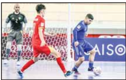
Players battling for the ball during Kuwait and Vietnam match. Kuwait suffered a narrow 5-4 defeat to Vietnam in its opening Group B match at the AFC Futsal Asian Cup finals in Jakarta, Indonesia. In the same group, Thailand secured a 2-0 win over Lebanon.