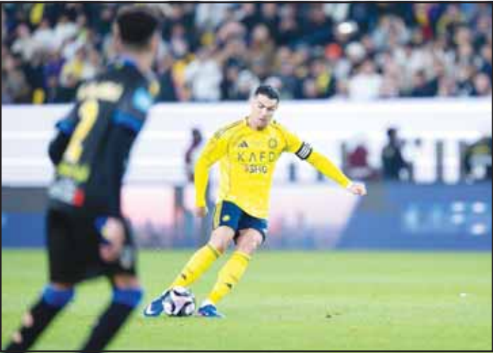
Cristiano Ronaldo takes a free kick during Al-Nassr match against Al-Taawoun.