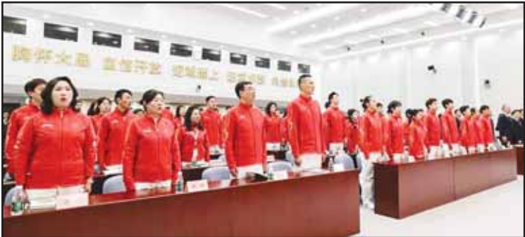
General view of the inaugural meeting of the Chinese delegation for Milan-Cortina 2026 Olympic Winter Games in Beijing.

The 2026 Winter Games will take place from Feb. 6 to 22, featuring 116 events across 16 disciplines.