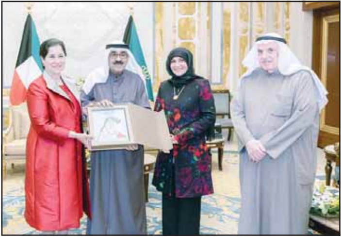
His Highness the Amir Sheikh Meshal Al-Ahmad Al-Jaber Al-Sabah is presented a book titled 'Kuwait in 400 years.'