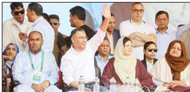
Tarique Rahman, the son of former prime minister Khaleda Zia and chairman of the Bangladesh Nationalist Party (BNP), raises his arm to greet supporters at a campaign rally ahead of next month's national elections, in Sylhet, Bangladesh on Jan 22.

With nearly 2,000 candidates in the race, including 1,732 from 51 registered political parties, the election campaign has already moved into a phase of direct voter contact: door-to-door canvassing,