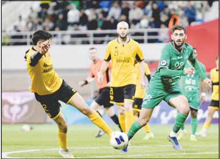
A file photo of Al-Arabi and Al-Qadsia players in action.

KUWAIT CITY, Jan 27: The semifinals of the Super Cup will be played today; with Kuwait Club facing Al-Salmiya at Jaber Al-Mubarak Stadium at 4:30 p.m. Fans will later witness a highly anticipated derby between Al-Qadsia and Al-Arabi at Jaber Al-Ahmad International Stadium at 7:30 p.m. Defending champion Kuwait Club heads into the match aiming to extend its strong run of form and maintain winning momentum. The team currently sits atop the Zain Premier League standings with 32 points, eight clear of nearest challenger, Al-Arabi, and has also secured a place in the Crown Prince Cup final. Kuwait Club is chasing another potential “quadruple” after sweeping all domestic titles last season. Al-Salmiya, meanwhile, will be looking to build on a morale-boosting 3–1 victory over Al-Tadamon in the previous round, which ended a difficult spell in league competition. Today’s clash marks the second meeting between the two sides this season, following a 1–1 draw in the league. Kuwait Club had previously eliminated Al-Salmiya from last season’s Super Cup semifinals