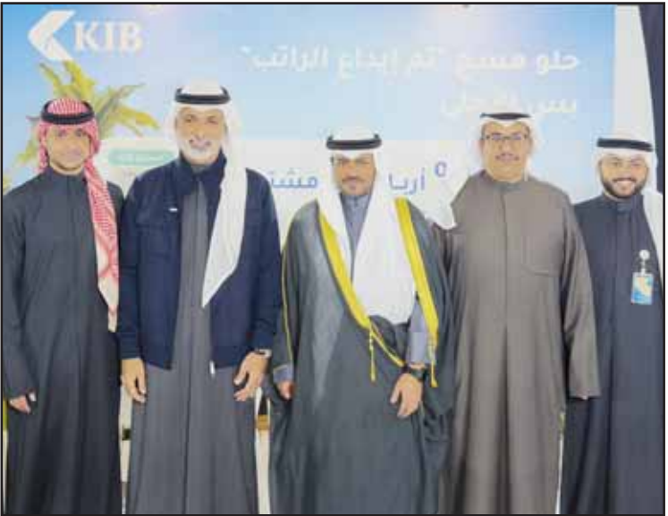
Officials pose for a photo during the 2026 Auto World Show.

KUWAIT CITY, Jan 27: Kuwait International Bank (KIB) wrapped up its participation in the Auto World Show 2026, held at the Kuwait International Fairground in Mishref from January 19 to 24, amid notable interest from visitors and automotive industry stakeholders. The Bank's participation reflects its keenness to engage in specialized economic events and reinforce its position in the local vehicle financing market. During the exhibition, KIB presented a comprehensive range of financing solutions designed to meet the needs of various customer segments. These included zero profit (0%) financing offers on selected car models, along with competitive profit rates and flexible credit facilities, such as grace periods allowing installment payments to be deferred for up to six months, in addition to