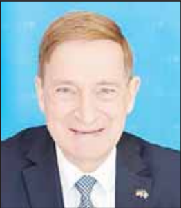
Freiherr von Reibnitz

He then confirmed the commitment to strengthen cooperation in technical and economic fields, and update the agreement on the avoidance of double taxation to keep pace with modern economic changes. He is hoping for progress in the next six months to strengthen the sustainable partnership between Germany and Kuwait.