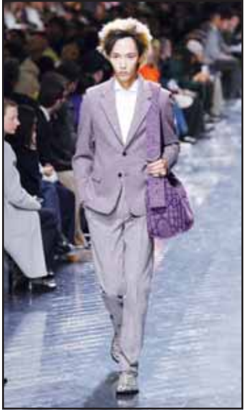
Models wear creations as part of the Dior Fall/Winter 2026-2027 Men's collection presented in Paris, Wednesday, Jan. 21.

PARIS, Jan 22, Dior’s menswear show arrived with a stripped-back set and a loud signal of confidence: neon-yellow wigs that read like a flag of authority planted in the Paris runway, after a couple of runway wobbles from their new designer. In an annex of the Rodin Museum lined with curtain fabric, Jonathan Anderson - the 41-year-old Northern Irish designer celebrated for turning Loewe into one of luxury’s most admired labels and now serving as Dior’s creative director - pared the décor down to near-nothing. On Wednesday, Anderson’s clothes finally carried the argument. The stakes were visible in the room: Robert Pattinson, Lewis Hamilton and SZA were among the VIPs packed in close. Then came the refrain: As one person in the front row put it: “Dior is back. It’s a good day for fashion.” This show felt like authority. Anderson’s Dior, at its weakest, has read like a montage of strong ideas still searching. Here, the principle was clear: tighten the story, sharpen the silhouettes, and ground the house in something firm. The gender-bending came through, but it was not weightless.