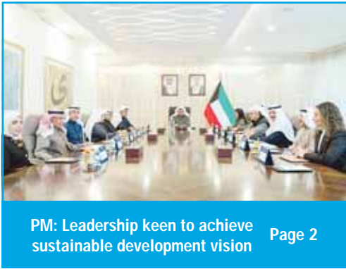
PM: Leadership keen to achieve sustainable development vision Page 2