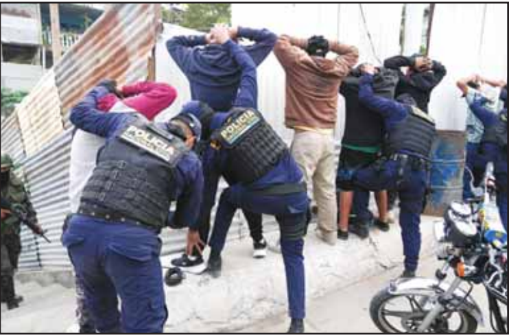
Police officers frisk men during the country’s state of emergency, following an escalation of gang-related violence, on the outskirts of Guatemala City on Jan 20.

Since October, about 130 South Korean scam suspects from Cambodia as well as more than 20 such Korean suspects from Laos, Vietnam, Thailand and the Philippines have been sent back home.