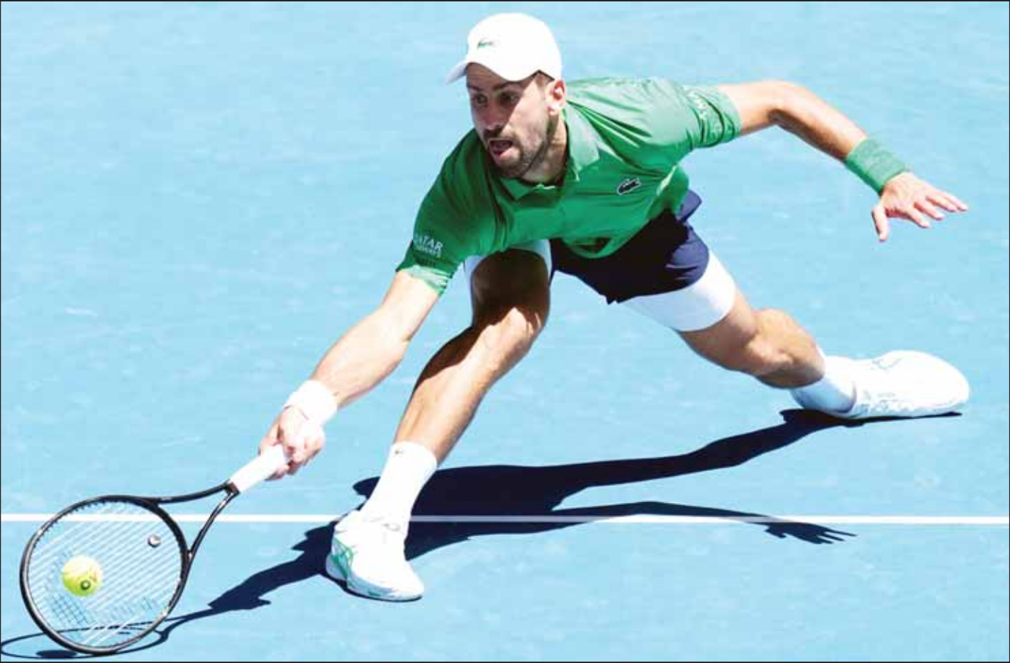
Novak Djokovic of Serbia plays a forehand return to Francesco Maestrelli of Italy during their second round match at the Australian Open tennis championship in Melbourne, Australia.

son. The France international is an unsung star for Villa, which badly missed Kamara when he tore his ACL in February 2024, keeping him out for eight months and forcing him to miss the European Championship. Everton winger Jack Grealish is being assessed because of a foot injury that could reportedly keep him out for three months, which would be a blow to his hopes of getting back in the England squad ahead of the World Cup. There was some respite for Tottenham manager Thomas Frank this week with a win over Borussia Dortmund in the Champions League. Before that, fans had expressed their unhappiness with Frank by taunting him with songs calling for his departure during a 2-1 loss to West Ham in the league last weekend. Losing at next-to-last Burnley on Saturday would likely revive complaints about the Danish coach, who has only been in charge for seven months but has been criticized for his pragmatic tactics.