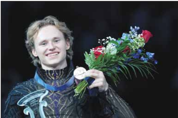
Gold medalist Ilia Malinin poses with his medal during the men's free skate competition at the U.S. Figure Skating Championships in St. Louis.

He tagged along to the rink with his parents as a child, though he initially preferred soccer to skating. Once he began landing the big jumps