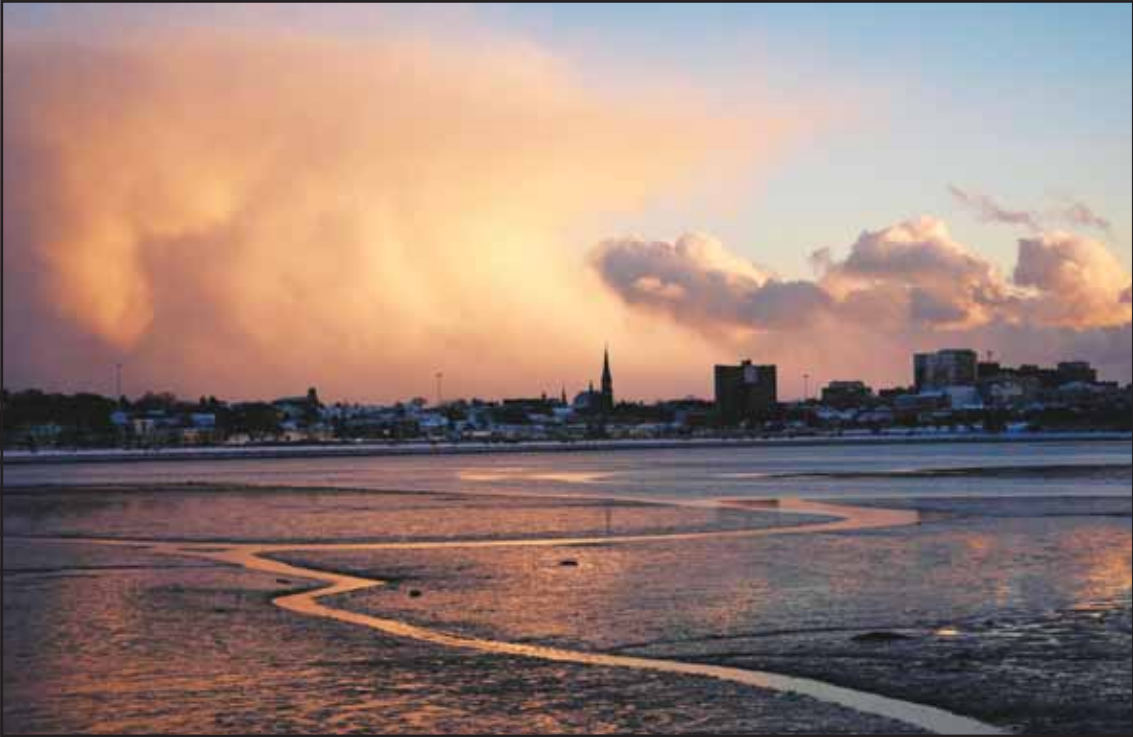
Storm clouds that had brought brief snow flurries begin to clear on Jan 20, over Portland, Maine.