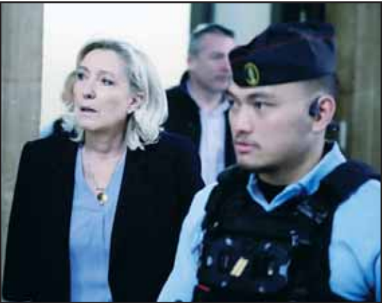
Far-right leader Marine Le Pen, (left), walks outside the courtroom during a short break in her appeals trial in Paris, on Jan 20.

PARIS, Jan 22, French far-right leader Marine Le Pen acknowledged “a mistake” on Wednesday at an appeals trial hearing in Paris that could derail her presidential ambitions, but firmly denied accusations she was at the center of a fraudulent system to siphon off European Union funds. Le Pen, 57, is seeking to overturn a March 2025 ruling that found her guilty of misusing EU Parliament funds in the hiring of aides from 2004 to 2016. She acknowledged some people paid as EU parliamentary aides performed work for her party, then known as the National Front, during that period. “The mistake lies here: there were certainly some aides, on a case-by-case basis, who must have worked either marginally, more substantially, or entirely... for the benefit of the party. And voilà,” Le Pen told the three-judge panel.