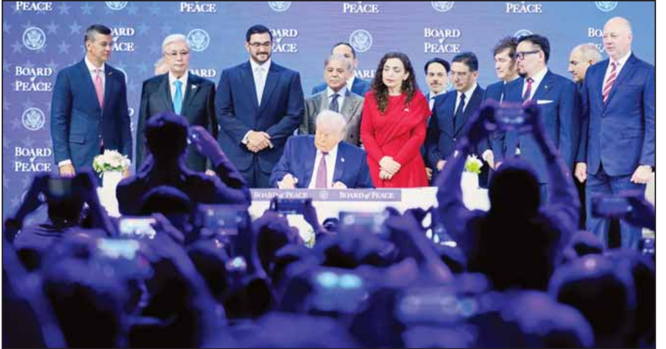
Left: US President Donald Trump holds up a signed Board of Peace charter during the Annual Meeting of the World Economic Forum in Davos, Switzerland, Thursday, Jan. 22, 2026. Right: Trump signs the charter of his Board of Peace initiative at the Annual Meeting of the World Economic Forum in Davos, Switzerland, Thursday, Jan. 22, 2026.

KUWAIT CITY, Jan 22, (Agencies): The Ministry of Foreign Affairs expressed Kuwait's welcome of the invitation extended to His Highness the Amir Sheikh Meshal Al-Ahmad Al-Jaber Al-Sabah by President Donald Trump, President of the friendly United States of America to join the Board of Peace for Gaza.