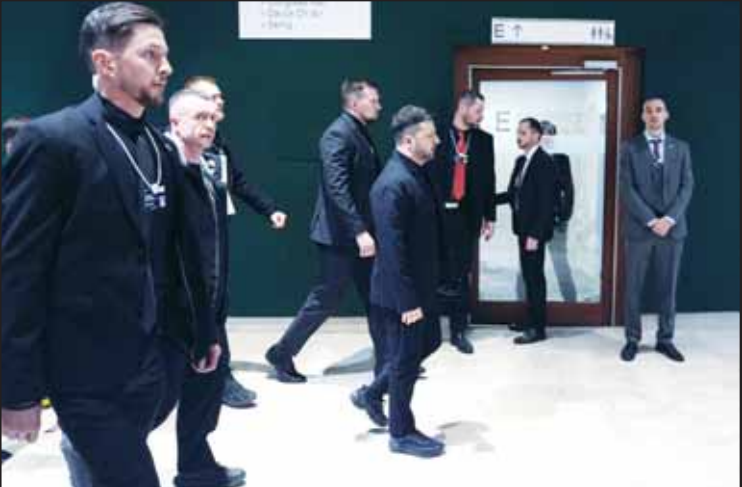
Ukraine’s President Volodymyr Zelenskyy, center, walks in the corridor as he arrives for the Annual Meeting of the World Economic Forum in Davos, Switzerland on Jan 22.