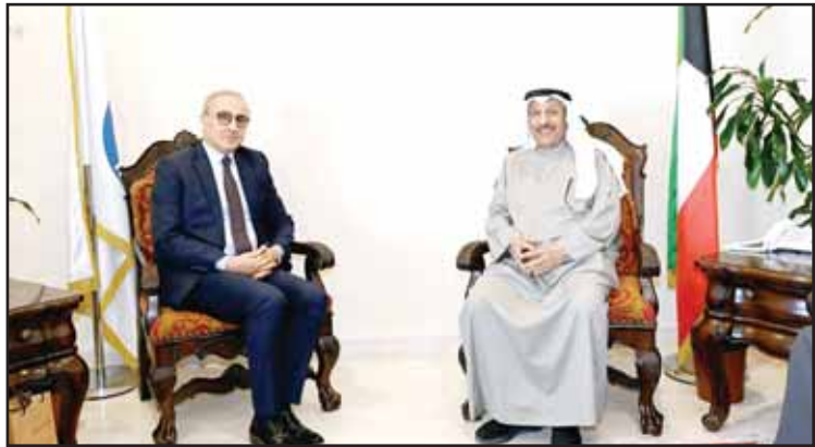
The President of the Red Crescent receives the Ambassador of the Republic of Tunisia at the Society's headquarters.