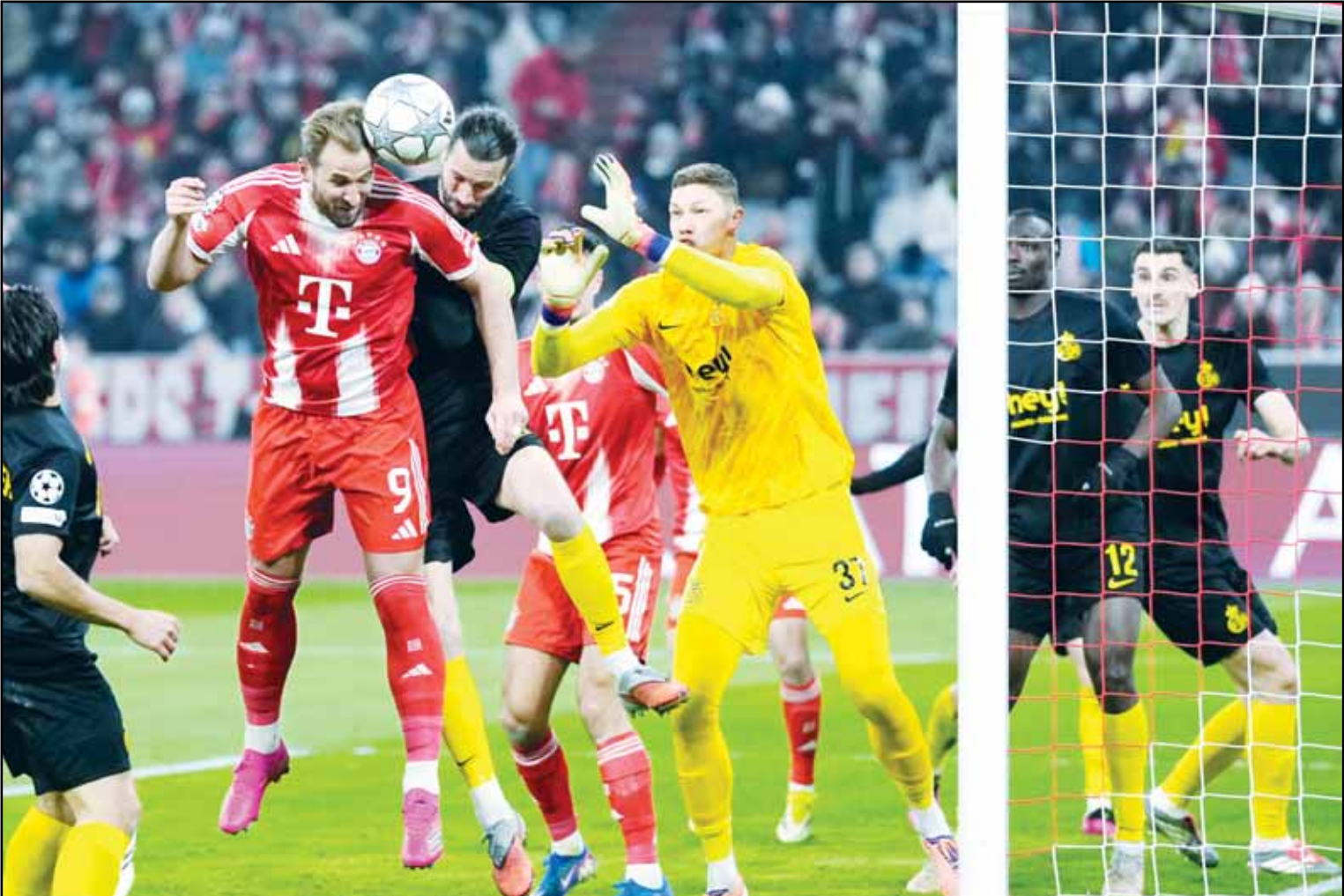
Bayern's Harry Kane, left, scores the opening goal during the Champions League opening phase soccer match between Bayern Munich and Union Saint-Gilloise, in Munich, Germany.

Fermin Lopez also scored twice as Barcelona fought back to beat Slavia