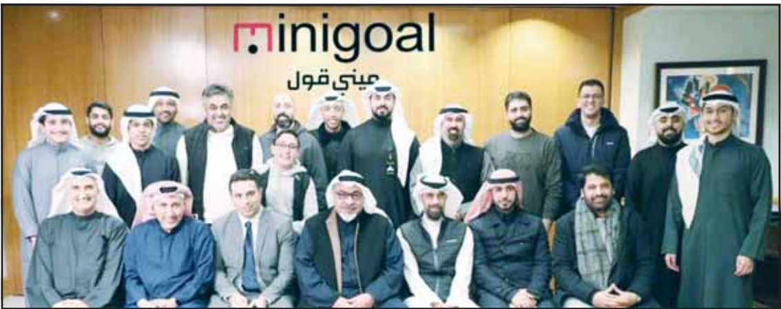
Representatives of local and Gulf media outlets pose for a group photo after the press conference.

Al-Tadamon (9th, 5 points) hopes to exploit home advantage and secure its second win of the season, keeping its campaign alive.