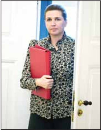
Danish Prime Minister Mette Frederiksen after a meeting in the Foreign Policy Committee at Christiansborg in Copenhagen, Denmark on Jan 20.

COPENHAGEN, Denmark, Jan 22, Denmark’s prime minister insisted that her country can’t negotiate on its sovereignty on Thursday after US President Donald Trump said he agreed a “framework of a future deal” on Arctic security with the head of NATO. Trump on Wednesday abruptly scrapped the tariffs he had threatened to impose on eight European nations to press for US control over Greenland, a semiautonomous territory of NATO ally Denmark. It was a dramatic reversal hours after he insisted he wanted to get the island “including right, title and ownership” - though he also said he would not use force. He said “additional discussions” on Greenland were being held concerning the Golden Dome missile defense program, a multilayered, $175 billion system that for the first time will put US weapons in space. Trump offered few details, saying they were still being worked out. NATO said its secretary general, Mark Rutte, hadn’t proposed any compromise to Danish sovereignty. Danish Prime Minister Mette Frederiksen said security in the Arctic is a matter for all of NATO, and it is “good and natural” that it be discussed be