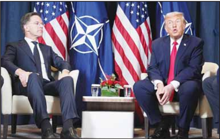
US President Donald Trump, right, meets with NATO Secretary General Mark Rutte during a meeting on the sidelines of the Annual Meeting of the World Economic Forum in Davos, Switzerland, Wednesday, Jan. 21, 2026.

America’s standing in the world uncertain.