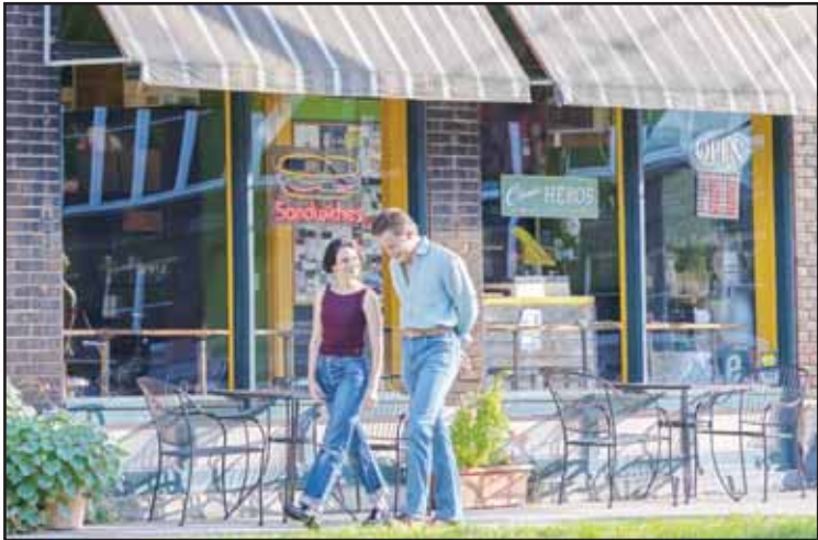
This image released by the Sundance Institute shows Jenny Slate (left) and Chris Pine in a scene from 'Carousel,' an official selection of the 2026 Sundance Film Festival.

By the time the dust has settled from Oscar nominations, the festival will already be in full swing with the world premieres of Amir Bar-Lev's documentary "The Last First: Winter K2" about the changing culture of extreme mountain climbing, Rachel Lambert's tender drama "Carousel," starring Chris Pine and Jenny Slate, and Judd