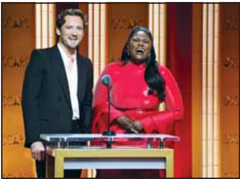
Lewis Pullman, (left), and Danielle Brooks present the nominees for the 98th Academy Awards on Thursday, Jan. 22, 2026, at the Samuel Goldwyn Theater in Beverly Hills, Calif.