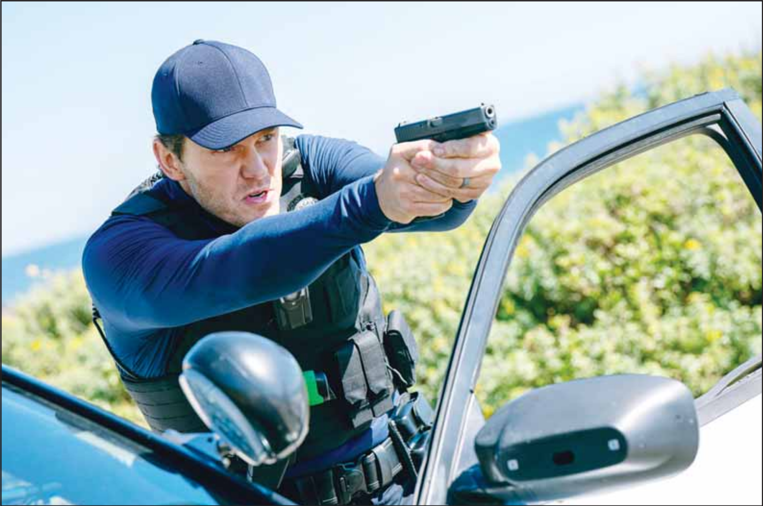
This image released by Amazon MGM Studios shows Chris Pratt in a scene from 'Mercy.'