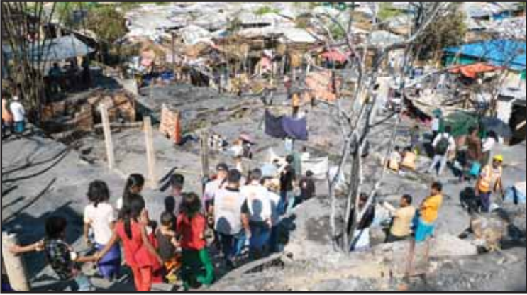
Children walk near the site of a fire that broke out in Camp 16, one of more than 30 Rohingya refugee camps in the Cox’s Bazar district, Bangladesh on Jan 20.

With the Awami League excluded from the election, a 10-party alliance led by Jamaat-e-Islami, an Islamist party, is seeking to expand its influence. Jamaat-e-Islami has long faced criticism from secular groups who say its positions challenge Bangladesh’s secular foundations. A new party