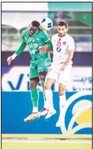
In this file photo, Kuwait Club and Al-Arabi players vie for the ball.

Fans are eagerly awaiting this pivotal encounter between league leaders Kuwait Club and its closest challengers Al-Arabi. A win for Kuwait Club would strengthen its bid to defend the league title, bringing it closer to a fifth consecutive championship and the 21st overall in club history. Kuwait Club has been remarkably consistent this season and is aiming to maintain its unbeaten run.