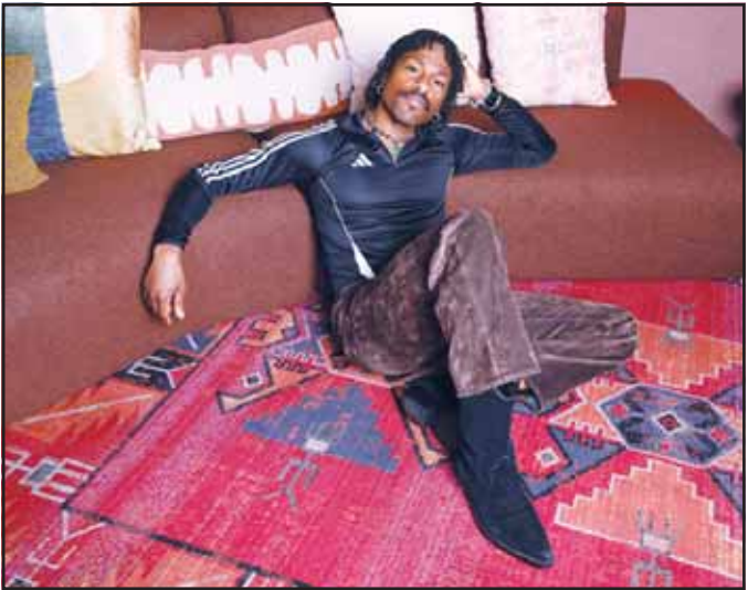
Duckwrth poses for a portrait at Amazon’s studio 126 in Culver City, Calif on Monday, Dec. 29, 2025.