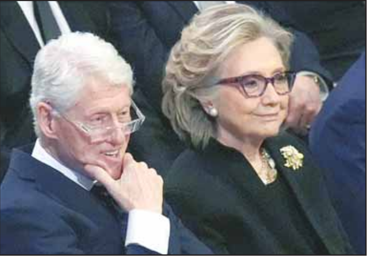
Former US president Bill Clinton and former secretary of state Hillary Clinton listen during the state funeral for former president Jimmy Carter at Washington National Cathedral in Washington on Jan 9, 2025.