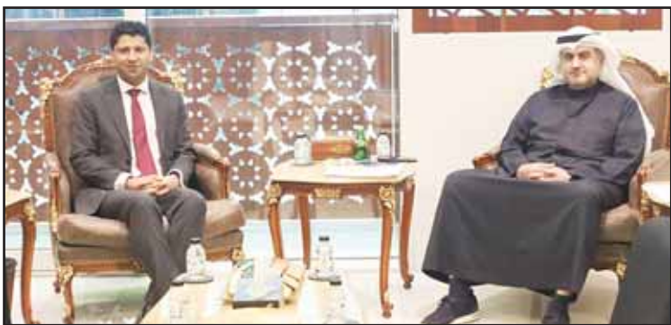
Minister of Justice Nasser Al-Sumait with UK Ambassador.