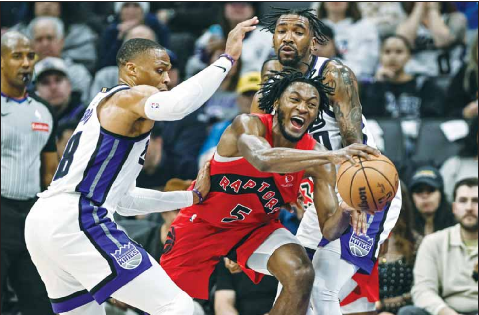
Toronto Raptors guard Immanuel Quickley (5) is fouled by Sacramento Kings guard Malik Monk (0) during the first half of an NBA basketball game in Sacramento, Calif.

In Charlotte, Donovan Mitchell scored 24 points, Evan Mobley added 14 points and 14 rebounds and the Cleveland Cavaliers jumped out to 21-point first-quarter lead and held on to beat the Charlotte Hornets for their fifth road win in the last