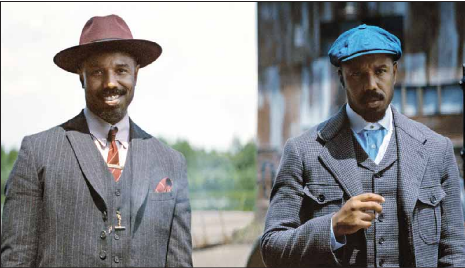
This image released by Warner Bros Pictures shows Michael B. Jordan portraying two characters in a scene from 'Sinners.'