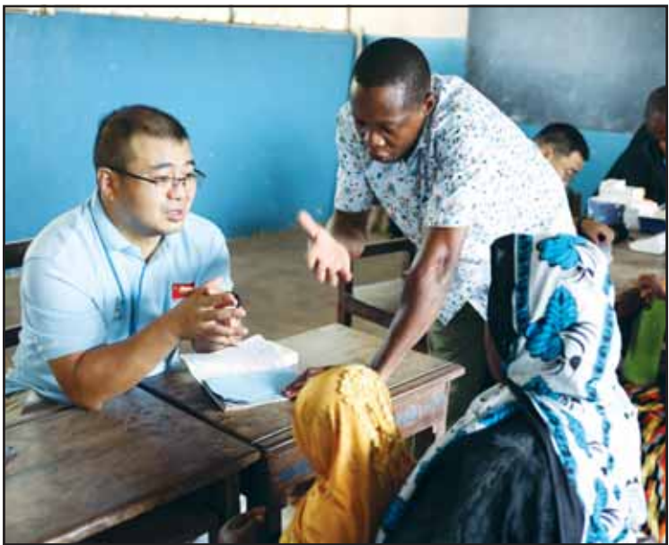
A member (first left) of the 35th Chinese medical team in Zanzibar provides free medical services on Pemba Island of Zanzibar, Tanzania, on Jan. 20.