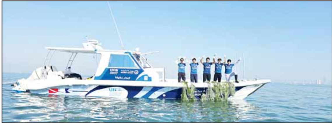
Kuwaiti diving team removes two tons of debris and fishing nets from Umm Al-Namil Island.

Al-Fadhel said removing the entangled fishing nets helps eliminate the so-called "ghost fishing nets," which pose a serious threat to marine life. Meanwhile, he explained that the cleanup campaign on the shores of Umm Al-Namil Island focused on removing plastic waste and debris that harm the island's aesthetic appeal and environmental value. Umm Al-Namil Island is the fourth largest island in Kuwait and serves as a vital stopover for migratory birds traveling from North Asia to Africa, providing safe havens for rest, food, and nesting during their migration. Al-Fadhel expressed the Kuwait Dive Team's appreciation for the government's pioneering plan to preserve Kuwait Bay, emphasizing that the combined efforts of volunteers and strict government oversight help restore ecological balance and ensure the continued cleanliness and sustainability of the marine environment.