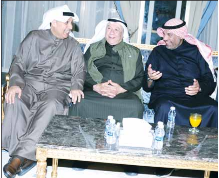
Minister of Foreign Affairs Abdullah Al-Yahya, Mahmoud Boushahri, and Sheikh Hamad Jaber Al-Ali