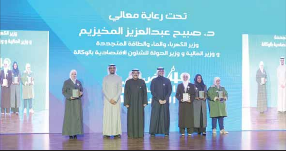
Crowning the female winners of the Sustainability Award from Kuwait Finance House.