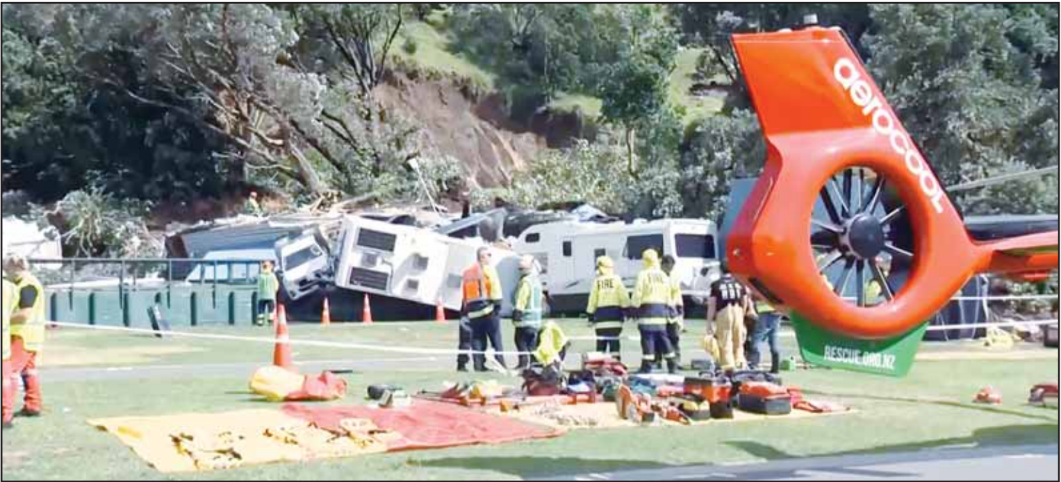
In this image from a video, rescuers and fire crews work near the site of a landslide at the base of Mount Maunganui on New Zealand's North Island on Jan 22.