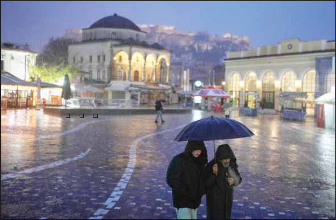
Pedestrians with an umbrella walk in Monastiraki square during a rainstorm in Athens on Jan 21, as a wave of severe weather brings heavy rain, thunderstorms, snowfall and gale-force winds across the country.