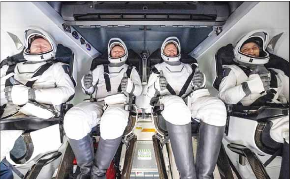
From left, NASA astronaut Butch Wilmore, Russia’s Alexander Gorbunov, and NASA astronauts Nick Hague and Suni Williams sit inside a SpaceX capsule onboard the SpaceX recovery ship Megan after landing in the water off the coast of Florida, March 18, 2025.

CAPE CANAVERAL, Fla., Jan 22, The astronauts evacuated last week from the International Space Station say a portable ultrasound machine came in “super handy” during the medical crisis. During their first public appearance since returning to Earth, the four astronauts refused Wednesday to say which one of them needed medical attention and for what reason. It was NASA’s first medical evacuation in 65 years of human spaceflight. NASA’s Mike Fincke said the crew used the onboard ultrasound machine once the medical problem arose Jan. 7, the day before a planned spacewalk that was abruptly canceled. The astronauts had already used the device a lot for routine checks of their body changes while living in weightlessness, “so when we had this emergency, the ultrasound machine came