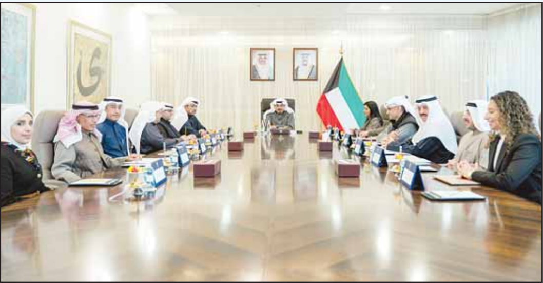
His Highness the Prime Minister Sheikh Ahmad Al-Abdullah Al-Ahmad Al-Sabah chairs the 44th ministerial committee meeting at Bayan Palace.

KUWAIT CITY, Jan 22, (KUNA): His Highness the Prime Minister Sheikh Ahmad Al-Abdullah Al-Ahmad Al-Sabah chaired on Thursday the 44th ministerial committee meeting at Bayan Palace to follow up on the implementation of major development projects. The meeting reviewed the latest reports from relevant government bodies on procedures related to key development projects, including Mubarak Al-Kabeer Port, the electricity sector, renewable energy development, low-carbon green waste recycling systems, housing development, environmental infrastructure for wastewater treatment plants, free zones, economic zones and efforts to combat desertification. He reaffirmed the keenness of Kuwait's leadership on providing continuous guidance toward achieving Kuwait's comprehensive and sustainable development vision, and speeding up all active projects. For his part, Assistant Foreign Minister for Asian Affairs and committee rapporteur Ambassador Sameeh Hayat said the meeting reviewed key achievements and possible challenges related to new major development projects proposals and opening avenues for strategic cooperation with various countries to deepen economic, trade and investment relations in line with Kuwait's strategic objectives.