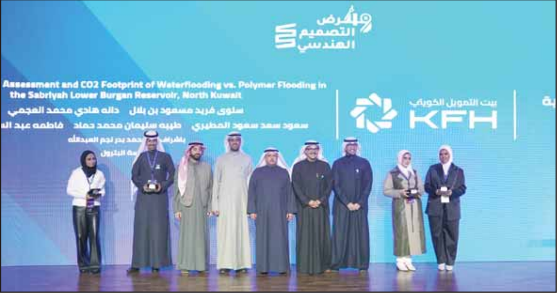
Honoring the winners of the Sustainability Award.

KUWAIT CITY, Jan 22: Kuwait Finance House (KFH) honored the winners of its Environmental Sustainability Award during a ceremony celebrating student projects from Kuwait University’s College of Engineering and Petroleum. The ceremony took place as part of the 49th Engineering Design Exhibition, which was held under the patronage of Minister of Electricity, Water and Renewable Energy and Acting Minister of Finance, Minister of State for Economic Affairs and Investments, Dr. Sabeeh Abdulaziz Al-Mukhaizeem.