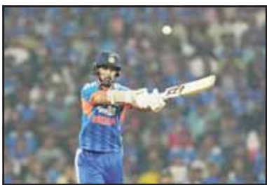
India's Arshdeep Singh plays a shot during the first T20 cricket match between India and New Zealand in Nagpur, India. Sharma scored 84 off 35 balls as India beat New Zealand by 48 runs in the opener of a five-match T20 series.