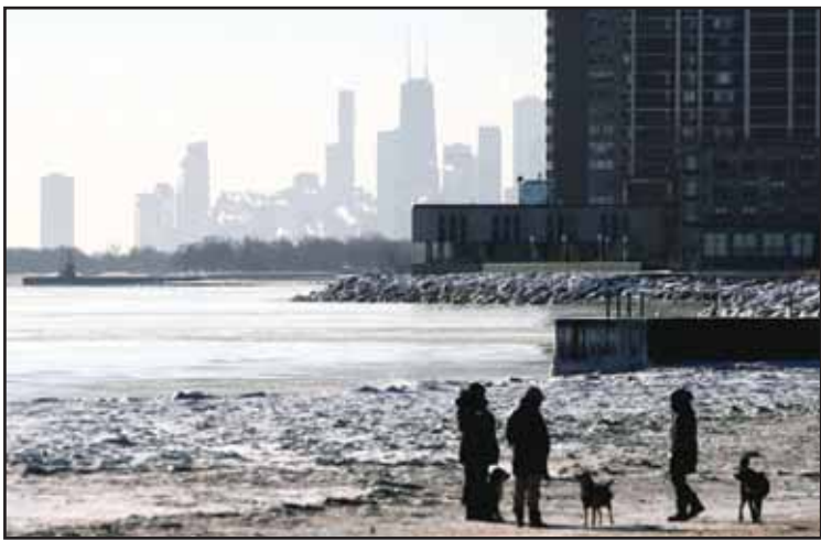
People walk their dogs on an ice covered beach at the Lake Michigan shore, Tuesday, Jan. 20, 2026, in Chicago. (AP)

HOUSTON, Jan 22, (AP): Winter weather brings various hazards that people have to contend with to keep warm and safe. These dangers can include carbon monoxide poisoning, hypothermia and frozen pipes that can burst and make homes unlivable. Public safety officials and experts say there are multiple ways people can prepare themselves to avoid these winter weather hazards and keep themselves safe. The hazards are on the radar this week because millions of people in the United States are set to be hit with heavy snow, sleet and freezing rain from a “significant winter storm” this weekend that will impact the Midwest, the East Coast as well as much of the southern US, including Texas, Georgia and the Carolinas, according to the National Weather Service. Officials say that during a winter storm, people should stay indoors. But home heating systems running for hours can increase the risk of carbon monoxide poisoning as the deadly fumes can be produced by