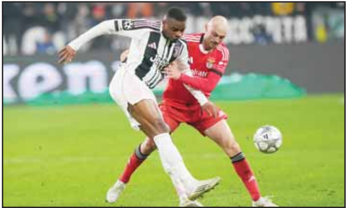
Juventus' Pierre Kalulu, left, challenges for the ball with Benfica's Leandro Barreiro during the Champions League opening phase soccer match between Juventus and SL Benfica in Turin, Italy.

MILAN, Jan 22, Napoli players are making life difficult for themselves and face an uphill struggle in Europe and at home. Coach Antonio Conte was fuming after Napoli could only draw against 10-man Copenhagen to leave it on the brink of Champions League elimination, saying he and his players should be "angry and disappointed" in themselves. "We all have to hold our hands up, there's little to talk about, we just need to be angry - very, very angry - with ourselves," Conte said. "Maybe we didn't perceive the importance of what was at stake." "It's as if we were running a race downhill and somehow we made it uphill all by ourselves." Napoli's injury problems continue to mount but Conte said his team should still have beaten Copenhagen, especially with a man advantage for most of the match.