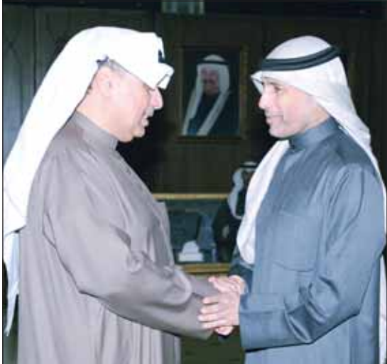
Marzouq Al-Ghanim shaking hands with Sheikh Hamad Jaber Al-Ali.