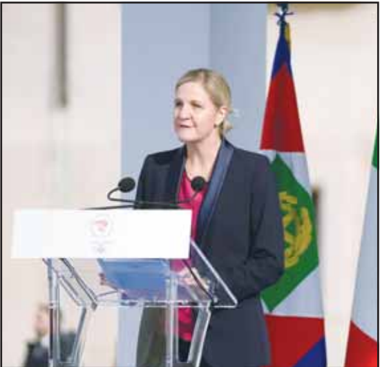
In this file photo, International Olympic Committee President Kirsty Coventry delivers her speech during the Milan Cortina 2026 Winter Olympics cauldron lighting, in front of the Quirinale Presidential Palace, in Rome.