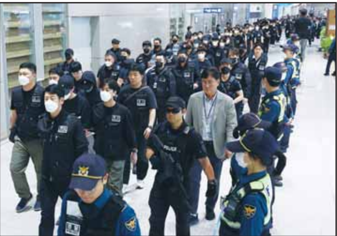
South Koreans, walking in the line to the left, who are allegedly involved in online scams in Cambodia arrive at the Incheon International Airport, in Incheon, South Korea, on Oct 18, 2025.

The suspects include a couple who allegedly operated a deepfake romance scam to dupe 12 billion won ($8.2 million) from about 100 people in fraudulent invest-