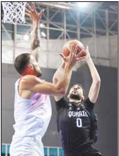
An Al-Qurain player goes for a basket as a Kuwait Club defender attempts to block the shot.

KUWAIT CITY, Jan 22: The fifth round of the second division national basketball league will feature two key matchups at Union Hall, Sheikh Saad Al-Abdullah Complex. The first game, scheduled for 5:00 PM, pits Kazma against Al-Nasr. Third-placed Kazma (19 points) will be looking to move past its early exit from the Asian Super League by asserting dominance over Al-Nasr (14 points). Kazma won convincingly in the first round, 110-47, and will aim to secure a semifinal spot. For Al-Nasr, the game is largely symbolic, as it is already out of contention for the playoffs. The second game, at 7:30 PM, features league leader and defending champion Kuwait Club (22 points) against Al-Qurain (18 points). Al-Qurain is in close contention for the fourth semifinal spot alongside Kuwait Club, Al-Qadisiya, and Kazma. However, the defending champion is heavily favored, with a roster packed with top talent. Kuwait Club defeated Al-Qurain 122-101 in their first-round meeting and will aim to repeat that