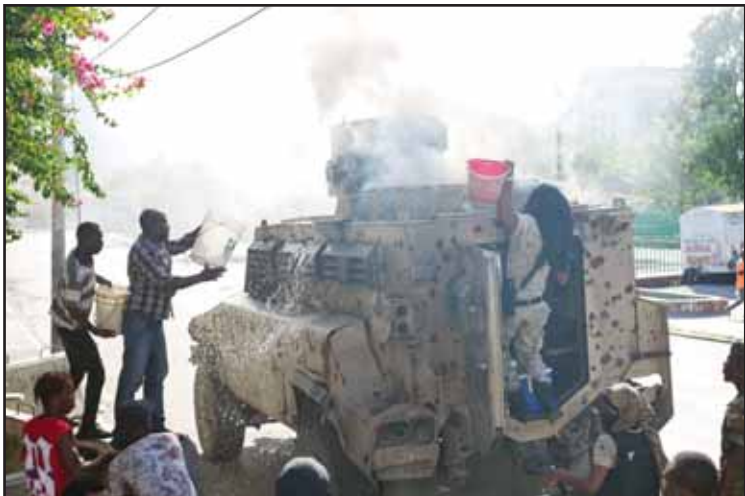
Police and civilians attempt to put out a fire set by gang members on an armored police vehicle in a gang-controlled area of Port-au-Prince, Haiti on Jan 19.

It’s the latest episode in years of political chaos that erupted after Haiti’s last elected president, Jovenel Moïse, was slain at his home in July 2021.