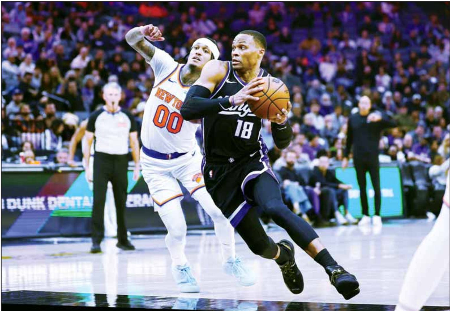
Sacramento Kings guard Russell Westbrook (18) drives to the basket past New York Knicks guard Jordan Clarkson (00) during the second half of an NBA basketball game in Sacramento, Calif.

Last year, the All Blacks lost to Argentina in Argentina for the first time. Their 43-10 loss to South Africa in Wellington was the largest in their history. They also lost to England at Twickenham in November.