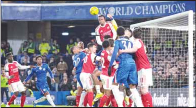
Arsenal's Gabriel heads the ball clear during the English League Cup semifinal first leg soccer match between Chelsea and Arsenal in London.

Still, Mikel Arteta's team is the favorite to advance to the March 22 final at Wembley Stadium in what is shaping up to be a banner season for the Gunners, who lead the Premier League by six points and top the Champions