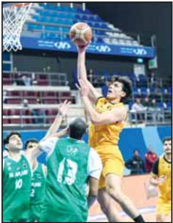
Qadsia player out-jumps the Al-Arabi defense to score.

Its superiority became clear in the third quarter as it tightened its grip on the game, stretching the margin to 86-54, before completing a one-sided