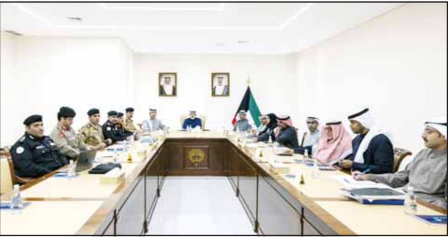
Deputy Foreign Minister Ambassador Sheikh Jarrah Jaber Al-Ahmad Al-Sabah chairs the Borders Committee meeting.

KUWAIT CITY, Jan 15, (KUNA): Deputy Minister of Foreign Affairs Ambassador Sheikh Jarrah Jaber Al-Ahmad Al-Sabah chaired a meeting of the Borders Committee held on Thursday at the headquar-