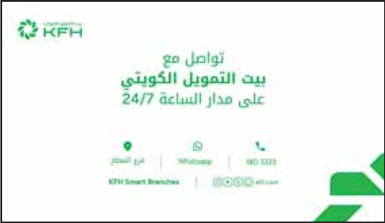
Kuwait Finance House holiday services.

Customers outside Kuwait can contact KFH’s call center from seven countries (USA, Canada, UK,