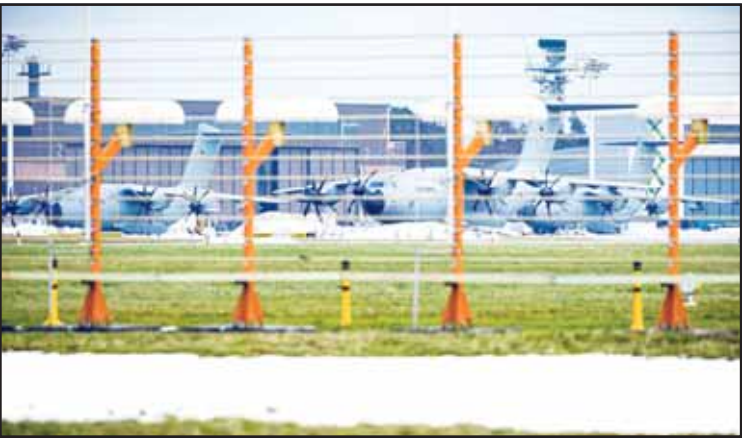
An Airbus A400M transport aircraft of the German Air Force is parked at Wunstorf Air Base in the Hanover region, Germany, Thursday, Jan. 15, 2026 as troops from NATO countries, including France and Germany, are arriving in Greenland to boost security.