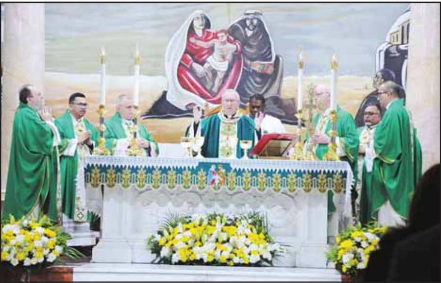
Cardinal Pietro Parolin presides over the solemn Mass at Holy Family Co-Cathedral, Kuwait city.

KFAS stressed that the project aligns with its strategy to build a scientifically capable Kuwaiti generation prepared for future challenges and to strengthen a knowledge-based economy, reflecting its continued commitment to nurturing talent and encouraging scientific curiosity that leads to innovation.