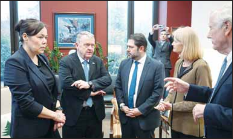
From left: Greenland Foreign Minister Vivian Motzfeldt, Danish Foreign Minister Lars Løkke Rasmussen, Sen. Ruben Gallego, Sen. Lisa Murkowski, and Sen. Angus King, begin a meeting on Capitol Hill as officials from Denmark and Greenland meet with lawmakers from the Arctic Caucus, at the Capitol in Washington, Wednesday, Jan. 14, 2026.