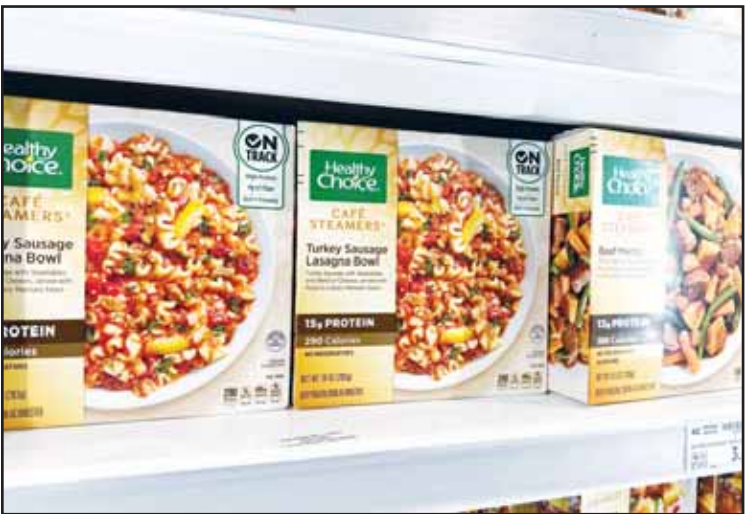
Meals with 'GLP-1 Friendly' labels sit on the shelf of a Kroger grocery store Tuesday, Jan. 13, 2026, in Ann Arbor, Mich.