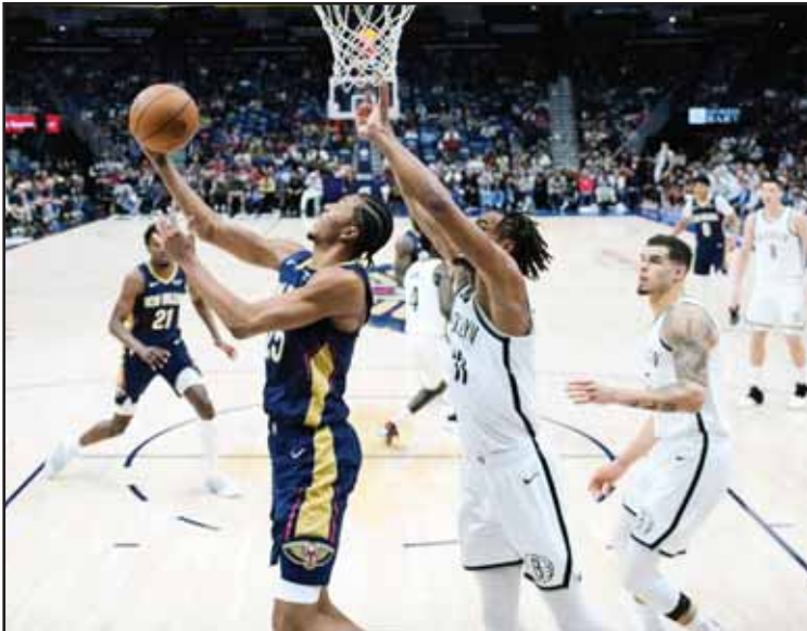
New Orleans Pelicans forward Trey Murphy III (25) goes to the basket against Brooklyn Nets center Nic Claxton (33) in the second half of an NBA basketball game in New Orleans.

The 19-year-old didn't come of the locker room for the second half before the announcement that he was out for the game. Flagg injured the same ankle two nights earlier, leaving briefly to get it taped before returning and leading Dallas with 27 points in a 113-105 victory over Brooklyn.