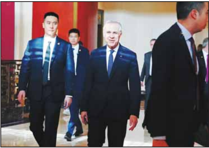
Left: Canada's Prime Minister Mark Carney, center, walks through a hotel lobby in Beijing, China Thursday, Jan. 15, 2026. Right: Canada's Foreign Minister Anita Anand, left, meets with Chinese Foreign Minister Wang Yi at the Great Hall of the People in Beijing, China Thursday, Jan. 15, 2026.

He urged both sides to view each other in a rational and amicable manner with an inclusive mindset, handle issues on the basis of mutual respect, focus on the agenda of cooperation,