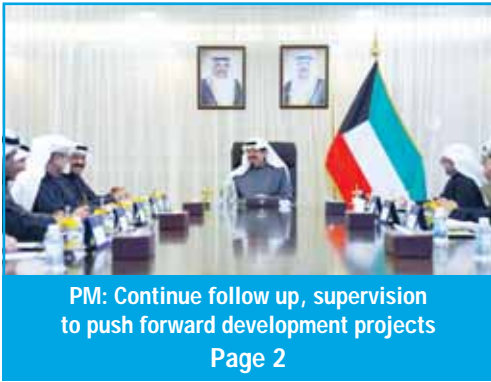
PM: Continue follow up, supervision to push forward development projects Page 2