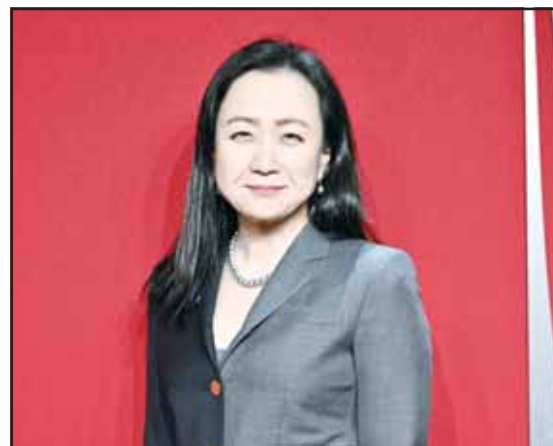
Min Jin Lee attends the GQ Global Creativity Awards in New York on April 6, 2023.

A native of Seoul whose family emigrated to New York City when she was 7, Lee attended the elite Bronx High School of Science, studied history at Yale University and law at Georgetown University. She knows well the importance of preparation, and laughs as she remembers that her father has nicknamed her "the turtle," because she is slow - but "very steady."