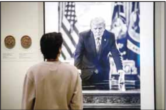
A visitor stops to look at a photograph of President Donald Trump and a short plaque next to it on display at the Smithsonian’s National Portrait Gallery’s ‘American Presidents’ exhibit on Sunday, Jan. 11, in Washington.