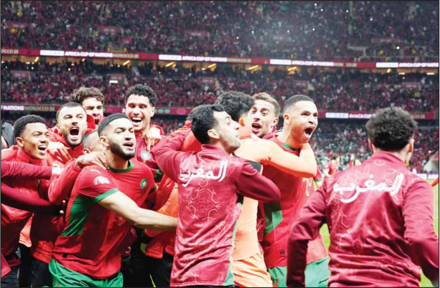
Morocco players celebrate after winning a penalty shootout during the Africa Cup of Nations semi-final match between Nigeria and Morocco in Rabat, Morocco.

Bassey was booked for a tactical foul outside the penalty box, which would have ruled him out of the final with a suspension if the Super Eagles made it.