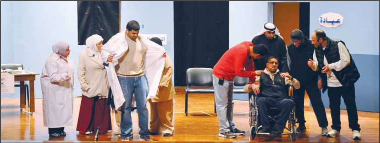
Children and adults with disabilities showcase their talent in a special performance of the play ‘Short Rope.’