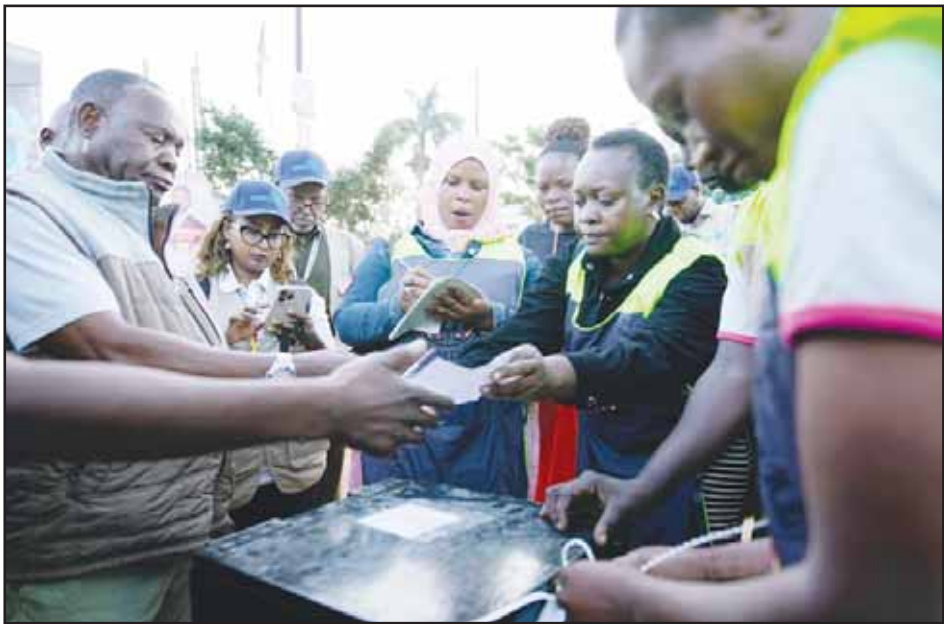
Voters observe the opening of ballot papers during presidential election in Kampala, Uganda, Thursday, Jan. 15, 2026.

In mid-2024, both countries signed the Reciprocal Access Agreement, which allows the deployment of forces of either country to the other's territory for joint and larger combat exercises, including live-fire drills. The RAA took effect in September.