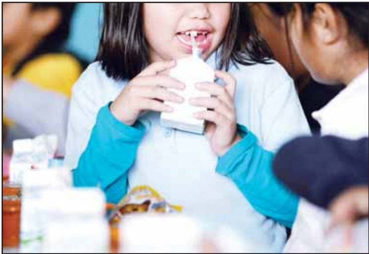
A student drinks milk in the cafeteria area of an elementary school in Los Angeles on Tuesday, Jan. 13, 2015. (AP)

WASHINGTON, Jan 15, (AP): Whole milk is heading back to school cafeterias across the country after President Donald Trump signed a bill Wednesday overturning Obama-era limits on higher-fat milk options. Nondairy drinks such as fortified soy milk may also be on the menu in the coming months following adoption of the Whole Milk for Healthy Kids Act, which cleared Congress in the fall. The action allows schools participating in the National School Lunch Program to serve whole and 2% fat milk along with the skim and low-fat products required since 2012. "Whether you're a Democrat or a Republican, whole milk is a great thing," Trump said at a White House signing ceremony that featured lawmakers, dairy farmers and their children. The law also permits schools to serve nondairy milk that meets the nutritional standards of milk and requires schools to offer a nondairy milk alternative if kids provide a note from their parents, not just from doctors, saying they have a dietary restriction. The signing comes days after the release of the 2025-2030 Dietary Guidelines for Americans, which emphasize consumption of full-fat dairy products as part of a healthy diet. Previous editions advised that consumers older than 2 should consume low-fat or fat-free dairy. Earlier this week, the Agriculture Department sent a social media post showing Trump with a glass of milk