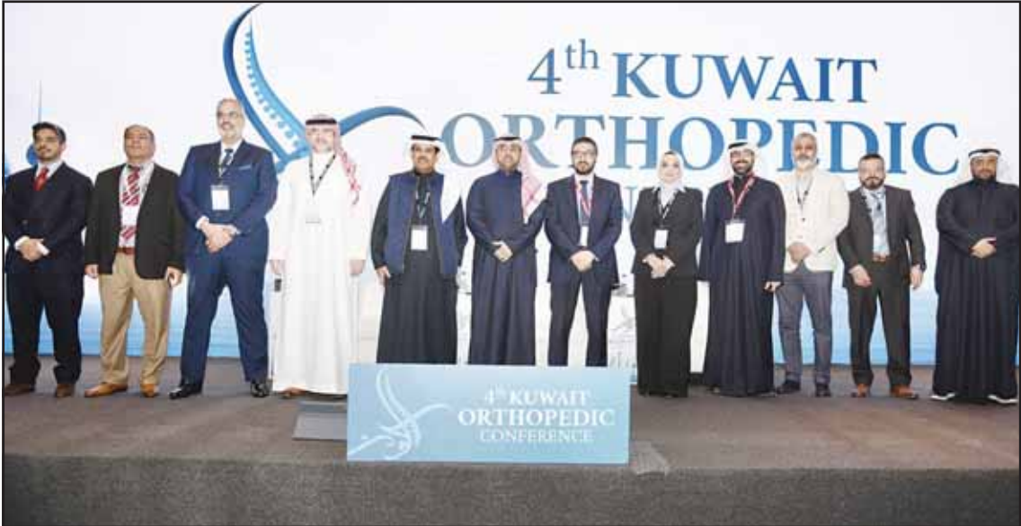
Participants and organizers of the 4th Kuwait Orthopedic Conference pose for a group photo, highlighting the Ministry of Health's commitment to advancing orthopedic care, surgical training, and professional development in Kuwait.

The ministry continues its diligent efforts to enhance healthcare services by investing in the ongoing education and training of doctors in all specialties, with the aim of achieving a quali-