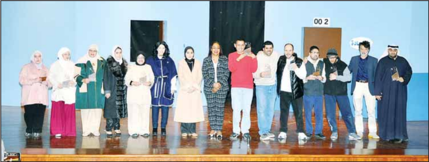
Minister of Social Affairs Dr. Amthal Al-Huwaila with officials from the Public Authority for Disability Affairs and the Ministry of Information.

In a vibrant celebration of talent and inclusivity, the Public Authority for Disability Affairs hosted a special performance of the play “Short Rope” on Wednesday. The event, attended by Minister of Social Affairs Dr. Amthal Al-Huwaila, was held in collaboration with the Ministry of Information and the UN Representative’s office, creating a colorful platform where art meets empowerment. The stage came alive as a group of dedicated performers with disabilities brought the play’s profound themes to life, captivating the audi-