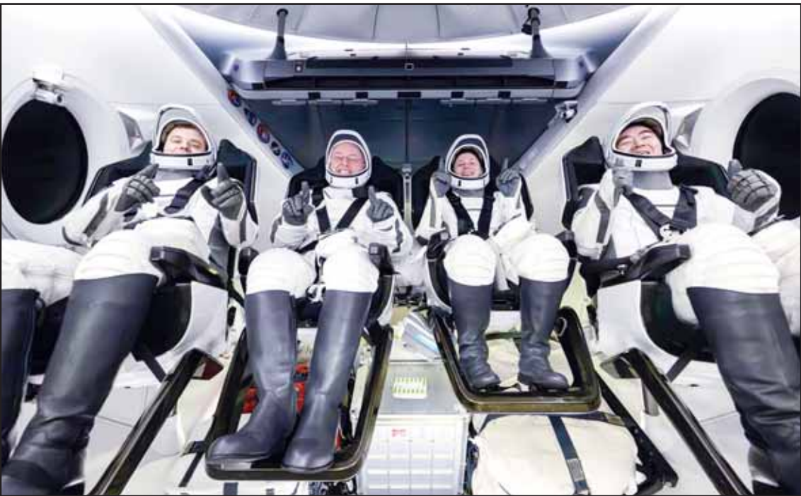
Roscosmos cosmonaut Oleg Platonov, left, NASA astronauts Mike Fincke, Zena Cardman, and JAXA (Japan Aerospace Exploration Agency) astronaut Kimiya Yui are seen inside the SpaceX Dragon Endeavour spacecraft onboard the SpaceX recovery ship SHANNON shortly after having landed in the Pacific Ocean off the coast of Long Beach, Calif., Thursday, Jan. 15.

along with experts from Gulf Cooperation Council (GCC) countries. This extensive engagement aims to facilitate the exchange of expertise and transfer of advanced medical knowledge to the region. The conference will also include specialized applied workshops covering a range of topics such as therapeutic apheresis, best practices in stem cell collection (MNC), the use of point-of-care ultrasound (POCUS) in clinical care, pain management, pediatric palliative care, and advanced medical training and simulation programs.