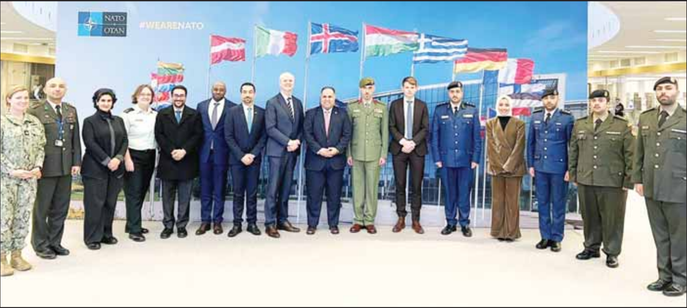
Kuwait National Guard (KNG) took part in the annual meeting to review the work of North Atlantic Treaty Organization’s (NATO) regional center and the Istanbul Cooperation Initiative (ICI).

“Therefore, the final word in justice must remain with the human judge. AI is a powerful tool that accelerates the discovery of truth and assists the judge in piecing together the threads of a crime. No matter how advanced it becomes, it can never replace a human judge.” — Compiled by Simi K. Kutty