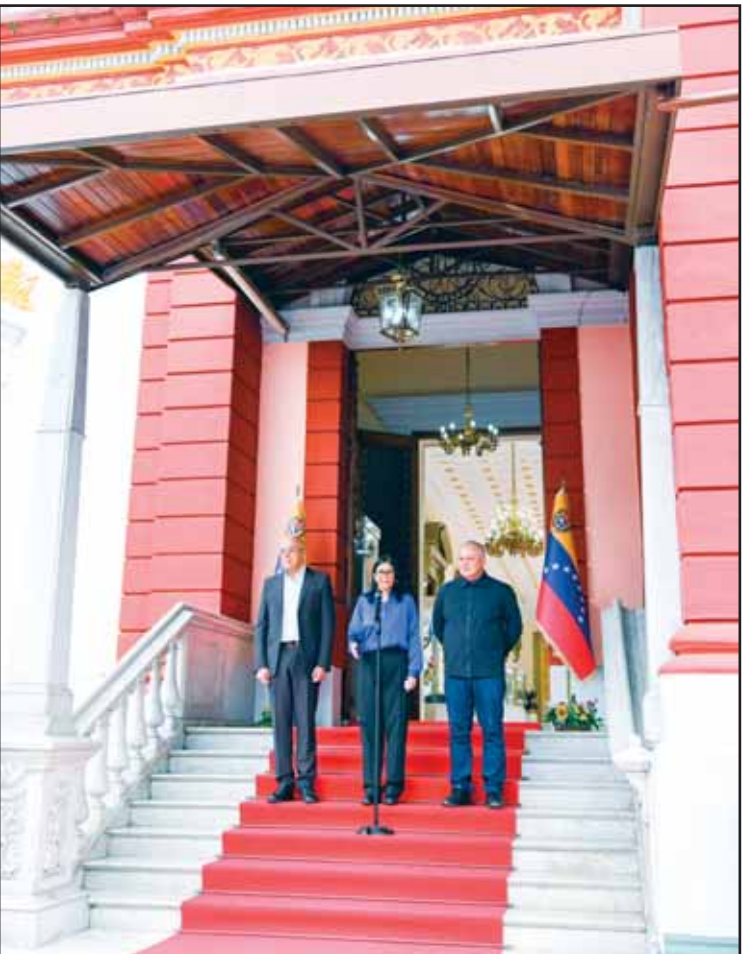
Venezuela's Acting President Delcy Rodríguez (center), National Assembly President Jorge Rodríguez (1st left) and Interior Minister Diosdado Cabello attend a press conference in Caracas, Venezuela, Jan. 14, 2026.

In endorsing Rodríguez, Trump has sidelined Machado, who has long been a face of resistance in Venezuela. She had sought to cultivate relationships with Trump and key advisers like Secretary of State Marco Rubio among