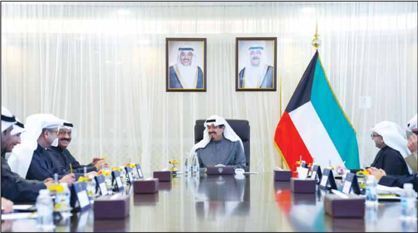
PM Diwan photo of development projects.

KUWAIT CITY, Jan 15, (KUNA): His Highness the Prime Minister Sheikh Ahmad Abdullah Al-Ahmad Al-Sabah urged a Ministerial Committee to speed up implementation of development projects in line with instructions of His Highness the Amir Sheikh Meshal Al-Ahmad Al-Jaber Al-Sabah.