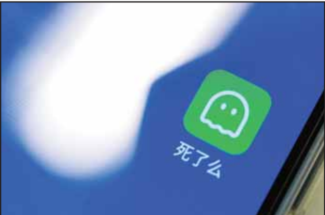
The app ‘Are You Dead?’ is seen on a smartphone in Beijing, China, Thursday, Jan. 15.