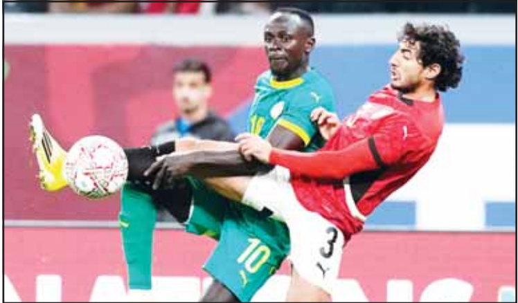
Senegal's Sadio Mane, and Egypt's Mohamed Hany, right, vie for the ball during the Africa Cup of Nations semifinal soccer match between Senegal and Egypt, in Tangier, Morocco.