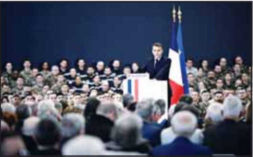
French President Emmanuel Macron delivers a speech as he visits the Istres military air force base, southern France, Thursday, Jan. 15, 2026.

ing the attack under the direction of Ukrainian intelligence agencies, said the FSB's Public Relations Center. The woman entered Russia through third countries and attempted to retrieve a stash of firearms and an improvised explosive device in Russia's Smolensk Oblast. The weapons were intended for the assassination of an employee at a defense-industrial complex enterprise in Russia's Leningrad Oblast, said the FSB. During the operation, security officers seized a Makarov pistol, an improvised explosive device made with foreign-produced plastic explosives, as well as communication equipment containing correspondence with coordinators located in Ukraine, it said. (Xinhua) □ □ □ Bulgaria nears new elections: Bulgaria moved closer to another round of early parliamentary elections on Wednesday after the second-largest parliamentary group refused to attempt to form a government. The decision was announced during a ceremony at