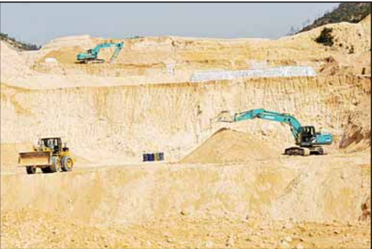
Workers use machinery to dig at a rare earth mine in Ganxian county in central China’s Jiangxi province on Dec. 30, 2010.

On Monday, in his speech at SpaceX, Defense Secretary Pete Hegs- eth revealed that the Pentagon has in the past five months alone “de-