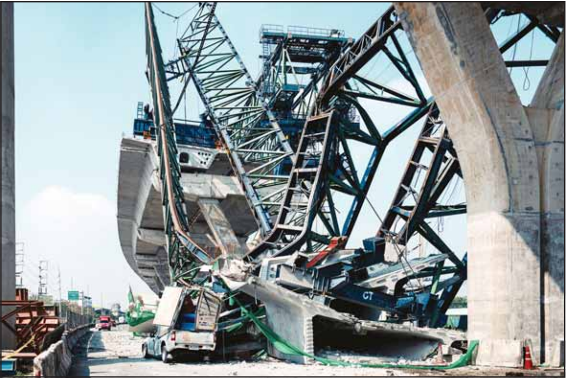
A construction crane that collapsed on the Rama 2 Road elevated expressway in Samut Sakhon province, Thailand on Thursday, Jan. 15, 2026.

Canadian authorities incensed China in late 2018 when they detained Meng Wanzhou, the chief financial officer of Huawei Technologies Co., at the request of the United States, which wanted her extradited to face charges. China responded by detaining two Canadians on spying charges, casting a pall over relations for more than two years.