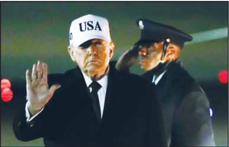
US President Donald Trump waves after arriving on Air Force One from Florida, Jan. 11, 2026, at Joint Base Andrews, Md.

WASHINGTON, Jan 15, US President Donald Trump's second term has been eventful. You wouldn't know it from his approval numbers. An AP-NORC poll from January found that about 4 in 10 U.S. adults approve of Trump's performance as president. That's virtually unchanged from March 2025, shortly after he took office for the second time. The new poll from The Associated Press-NORC Center for Public Affairs Research does show subtle signs of vulnerability for the Republican president. Trump hasn't convinced Americans that the economy is in good shape, and many question whether he has the right priorities when he's increasingly focused on foreign intervention. His approval rating on immigration, one of his signature issues, has also slipped since he took office. Here's how Americans' views of Trump have - and haven't - changed over the past year, according to AP-NORC polling. Call it a gift or a curse - for all his unpredictability, Trump's approval numbers just don't change very much. This was largely the case during his first term in office, too. Early in his first term, 42% of Americans approved of how he was handling the presidency. There were some ups and downs over the ensuing years, but he left office with almost the same approval. That level of consistency on presidential approval numbers could be the new normal for U.S. politics - or it could be unique to Trump. Gallup