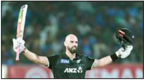
New Zealand's Daryl Mitchell celebrates after scoring a century during the second One Day International cricket match between India and New Zealand in Rajkot, India. Mitchell scored 131 not out off 117 balls as New Zealand beat India by seven wickets in the second one-day international to draw level in the three-match series.