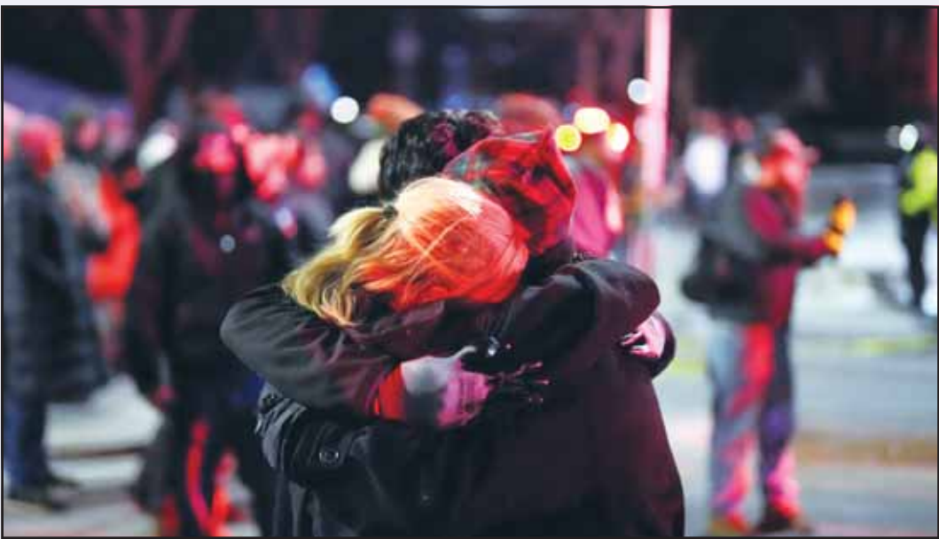
People hug near law enforcement after a shooting on Wednesday, Jan. 14, 2026, in Minneapolis.