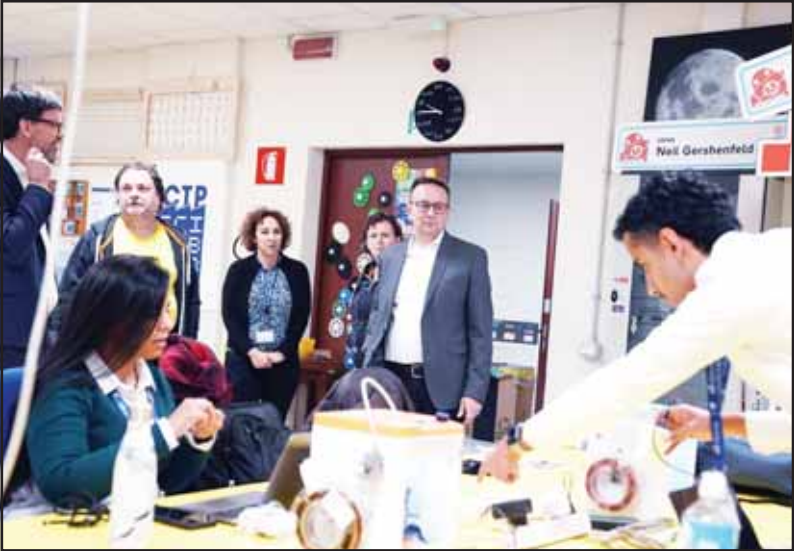
Kuwaiti specialists and guests observe hands-on training at the SciFabLab in Trieste, Italy.

New facility to boost hands-on STEM learning