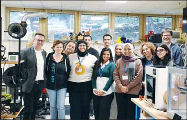
Kuwaiti specialists and ICTP experts pose for a group photo during SciFabLab training.

KUWAIT CITY, Jan 15, (KUNA): Kuwait Foundation for the Advancement of Sciences (KFAS) announced on Wednesday cooperation with the International Centre for Theoretical Physics (ICTP) to establish an advanced Scientific Fabrication Laboratory (SciFabLab) at The Scientific Center, one of KFAS’ affiliates, as a leading platform for interactive knowledge dissemination and hands-on scientific learning.