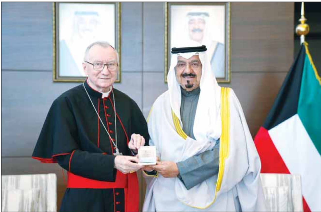
His Highness the Prime Minister Sheikh Ahmad Abdullah Al-Ahmad Al-Sabah with Secretary of State of the Vatican Cardinal Pietro Parolin.

KUWAIT CITY, Jan 15, (KUNA): His Highness the Prime Minister Sheikh Ahmad Abdullah Al-Ahmad Al-Sabah received, at Bayan Palace Thursday, Secretary of State of the Vatican Cardinal Pietro Parolin and a delegation accompanying him, a meeting attended by Foreign Minister Abdullah Al-Yahya.