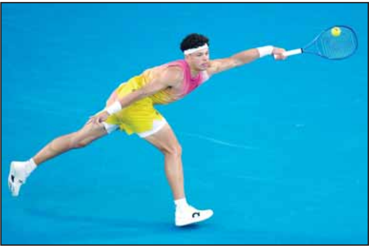
In this file photo, Ben Shelton of the U.S. plays a forehand return to Jannik Sinner of Italy during their semifinal match at the Australian Open tennis championship in Melbourne, Australia.

was conducted Thursday, Gauff was drawn to open against No. 91-ranked Kamilla Rakhimova and No. 576-ranked Williams - who made her Australian Open debut in 1998 and has twice reached the final - was drawn to face No. 68-ranked Olga Danilovic in the first round. Williams is set to become the oldest woman to compete in an Australian Open main draw, surpassing the record previously held by Japan’s Kimiko Date, who was 44 when she lost in the first round at Melbourne Park in 2015. To have any chance of facing Gauff again, she needs to do something she hasn’t done in 2026: record a win. In the last two weeks, Williams played tournaments in New Zealand and in Hobart, losing in the first round at both. After a 6-4, 6-3 win over Williams