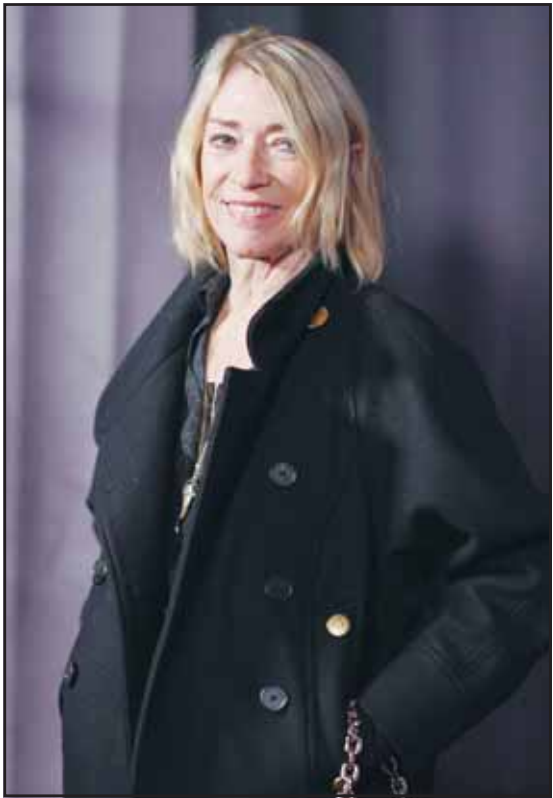
Kim Gordon appears at the premiere of 'The Chronology of Water' in Los Angeles on Jan. 8, 2026.