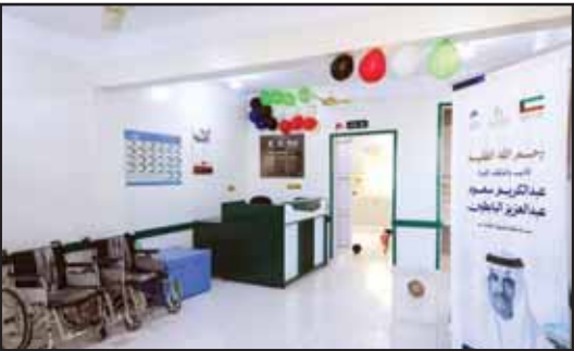
Al-Babtain Health Center includes 3 clinics and other health facilities.

The meeting reviewed the study’s objectives and implementation procedures, the role of school administrations in creating a conducive learning environment, and the technical and organizational readiness required to administer the electronic test in the selected schools.