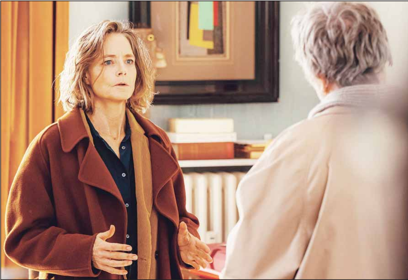
This image released by Sony Pictures Classics shows Jodie Foster in a scene from 'A Private Life.'