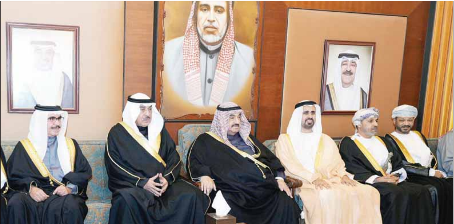
His Highness the Crown Prince, His Highness Sheikh Nasser Al-Mohammed, Bahraini Interior Minister Sheikh Rashid Al Khalifa, Sheikh Dhiyab Al Nahyan, and the Omani Interior and Foreign Ministers Hamoud Al Busaidi and Bader Al Busaidi.