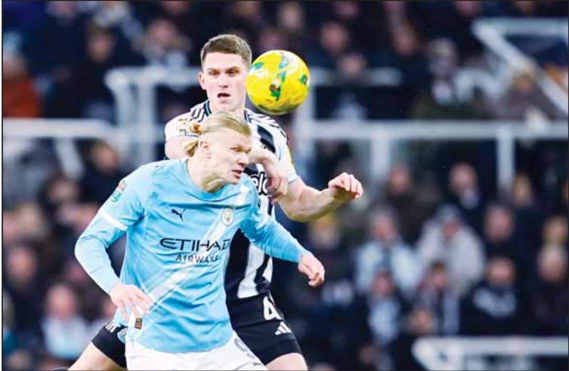
Manchester City's Erling Haaland, foreground, heads the ball past Newcastle's Sven Botman during the English League Cup semifinal first leg soccer match between Newcastle and Manchester City in Newcastle, England.

The League Cup could be the first of those, with City holding a two-