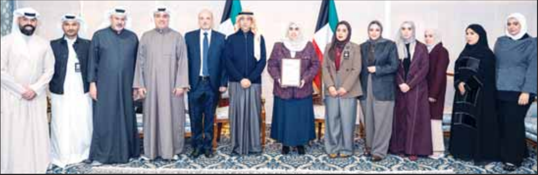
Officials and staff of the Ministry of Finance pose with their ISO/IEC 27001:2022 certification, marking a milestone in Kuwait's digital transformation and commitment to international standards in information security and data protection.