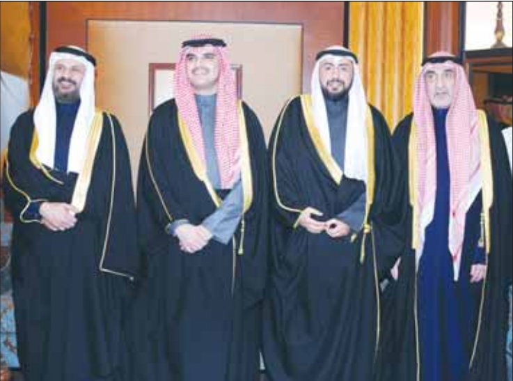
Sheikh Basel Al-Sabah offering congratulations.