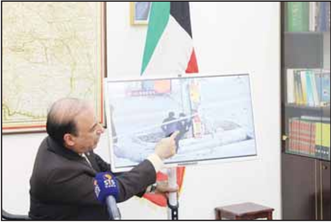
Ambassador of the Islamic Republic of Iran to Kuwait Mohammad Toutounchi addresses Kuwait media representatives during a press conference.

He affirmed that organizing peaceful gatherings is a legitimate right guaranteed by the Constitution and national legislation, and that Iran neither opposes such activities in principle nor in practice, adding that the country has