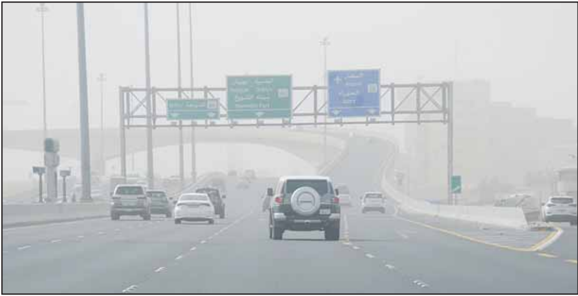
Thick suspended dust blankets roads as motorists braved harsh conditions Wednesday.