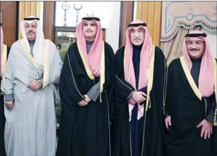
His Highness Sheikh Ahmed Al-Nawaf and Sheikh Khalid Al-Abdallah.