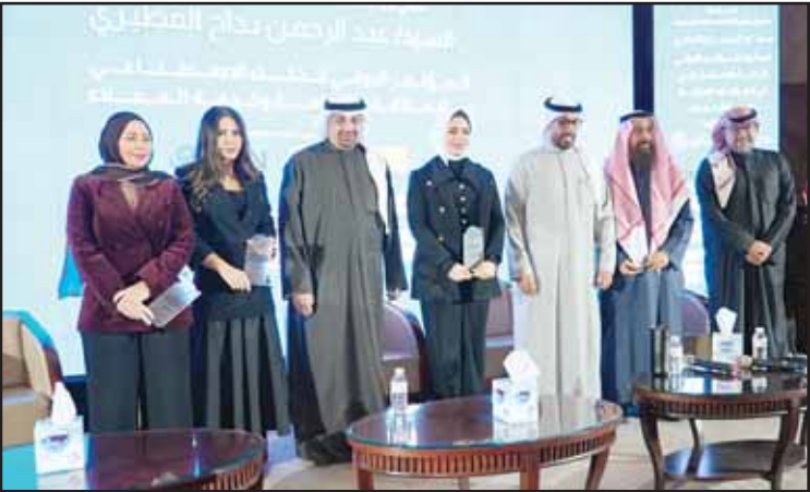
ALSAYER Group leaders participate in the conference sessions, reinforcing the Group’s commitment to innovation, responsible AI adoption, and service excellence aligned with Kuwait Vision 2035.

In addition, the conference featured specialized training sessions that enabled participants to apply AI concepts in practical contexts. These sessions focused on AI-supported decision-making, cybersecurity reinforcement, digital crisis management, and innovative customer service solutions through digital transformation. Through its strategic partnership, ALSAYER Group reinforced its commitment to knowledge exchange, talent development, and raising service standards, positioning the conference as a leading platform for advancing AI-driven public relations and customer service in Kuwait.