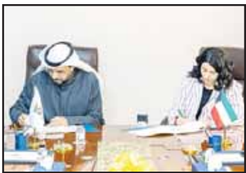
Director General of PADA and Namaa Charity CEO during their signing of an agreement to support and empower people with disabilities. 2035. She added that the partnership aims