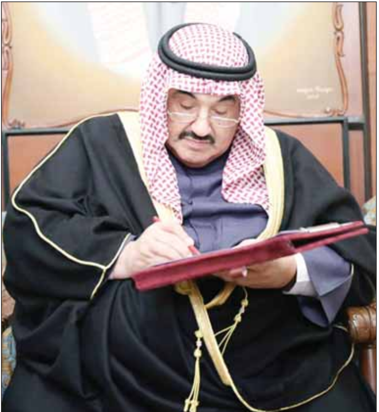
His Highness Sheikh Nasser Al-Mohammed as a witness to the wedding ceremony.