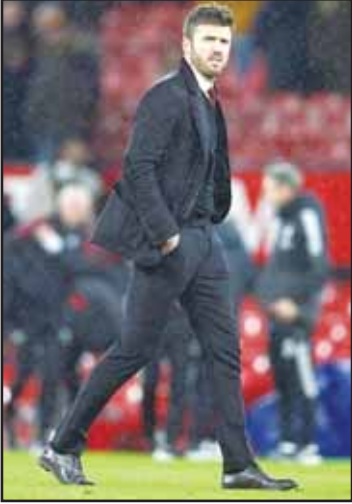
Manchester United's temporary coach Michael Carrick walks off the pitch at the end of the English Premier League soccer match between Manchester United and Arsenal at Old Trafford stadium in Manchester, England.