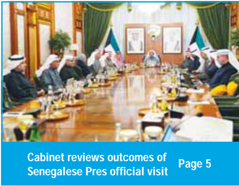
Cabinet reviews outcomes of Senegalese Pres official visit Page 5