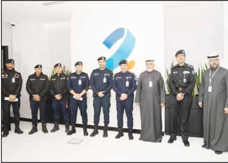
Burgan Bank leaders and several Ministry of Interior officials with the graduates.

evolving technological challenges. Transferring Burgan Bank's expertise in digital transformation and cybersecurity to MOI employees contributes to supporting national efforts aimed at protecting data and