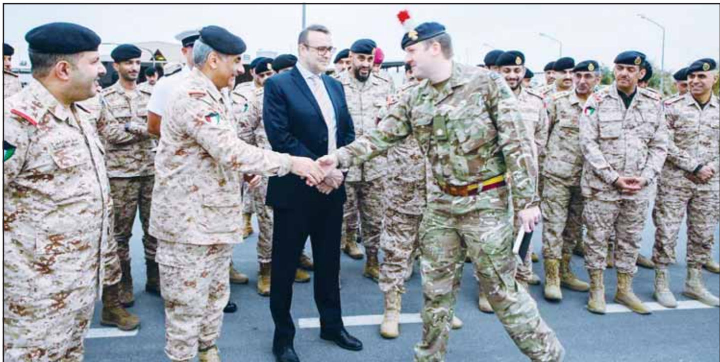
Kuwaiti, British senior commanders meet before the drill.

Featuring a number of Kuwaiti officials and the accompanying delegation members, the meeting also focused on sharing views on mechanisms on upgrading mutual collaboration in the upcoming period, it added.