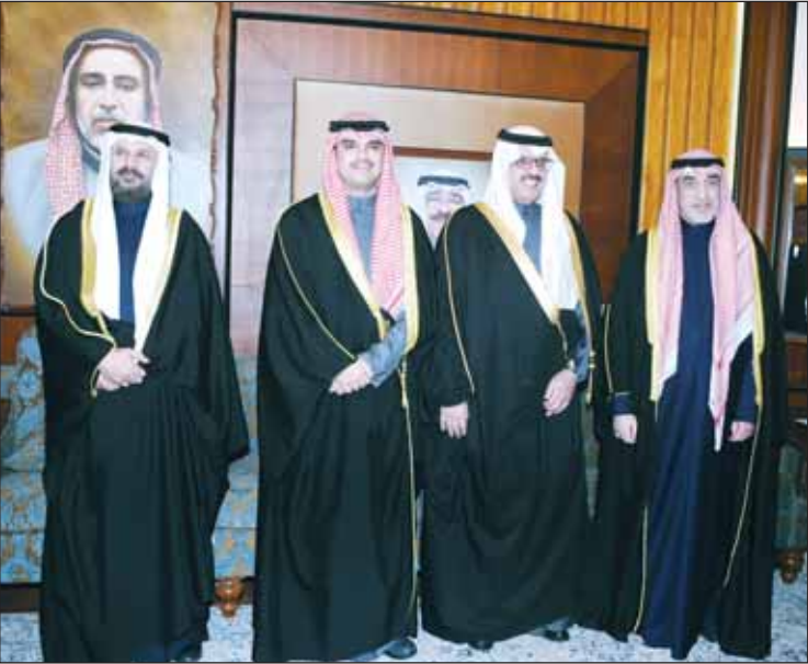
Saudi Ambassador Amir Sultan bin Saad congratulating.