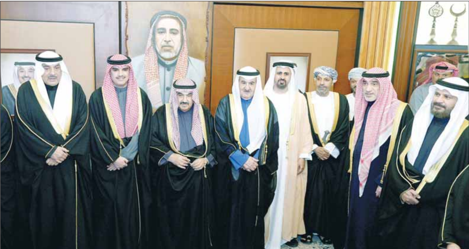
His Highness the Crown Prince Sheikh Sabah Al-Khaled, His Highness Sheikh Nasser Al-Mohammed, Sheikh Duaij Jaber Al-Ali, and the guests offer their congratulations.