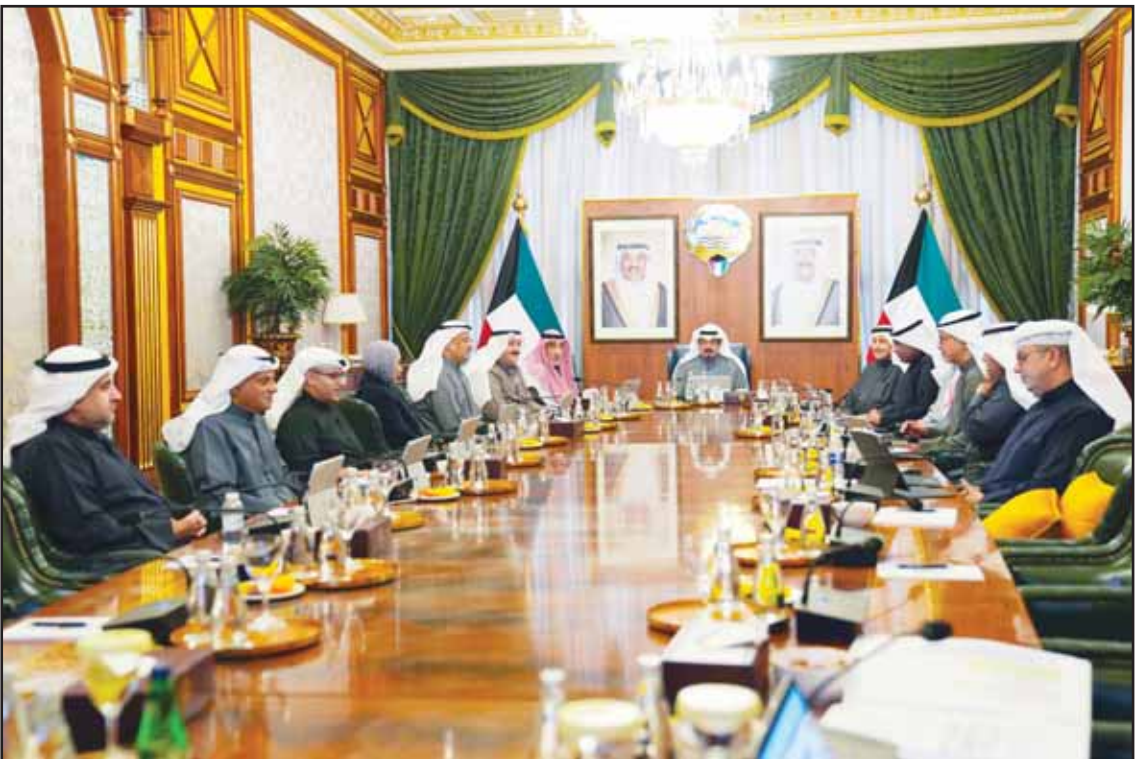
His Highness the Prime Minister Sheikh Ahmad Abdullah Al-Ahmad Al-Sabah chairs the weekly Cabinet meeting on Tuesday.

Nationality report approved, Sahl app reaches 3 million users