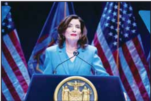
New York Gov. Kathy Hochul delivers the 2026 State of the State address, Tuesday, Jan. 13, 2026, in Albany, N.Y.

□ □ □ NY governor unveils agenda: New York Gov. Kathy Hochul used her annual State of the State address Tuesday to unveil a reelection year agenda aimed at bridging divides in the Democratic Party - moving to harness liberal anger at President Donald Trump and excitement over Mayor Zohran Mamdani, while also tending to moderates anxious about public safety and antisemitism. Speaking to a packed crowd at The Egg, a striking domed theater near the state’s ornate Capitol building, Hochul announced a slate of affordability proposals, including a plan to expand pre-kindergarten programs statewide. She also castigated the president’s immigration crackdown, saying protecting New Yorkers “also means standing up to ICE agents who abuse their power.”