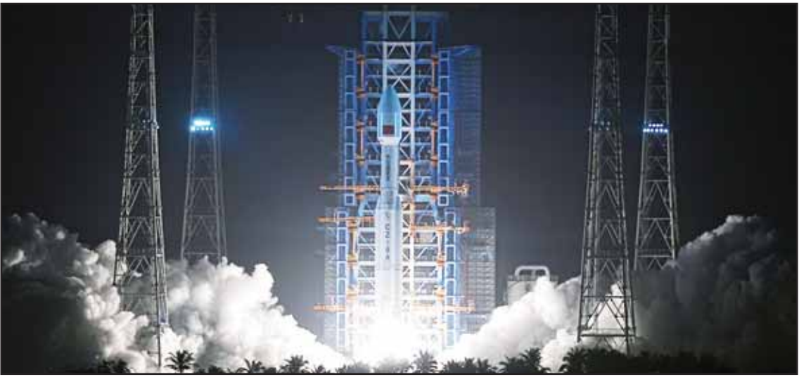
A Long March-8A carrier rocket carrying a new group of internet satellites blasts off from the Hainan commercial spacecraft launch site in south China's Hainan Province, Jan. 13.

According to the Regional Reference Laboratory for Polio Eradication at the National Institute of Health under the Ministry of National Health Services, Regulations and Coordination, the poliovirus was detected in a 4-month-old girl from North Waziristan district of the province. The total number of polio cases in Pakistan in 2025 has reached 31, including 20 from Khyber Pakhtunkhwa province, nine from southern Sindh province, and one each from eastern Punjab and northern Gilgit-Baltistan region. While the overall trend shows a decline in positive detections of poliovirus compared to 2024, reflecting the impact of high-quality vaccination campaigns conducted in 2025, virus circulation persists in certain high-risk areas, said the health ministry, adding that these detections underscore the continued need for robust, targeted efforts to interrupt transmission. Pakistan has planned to conduct nationwide polio campaigns this year that are designed to rapidly boost children's immunity and enhance protection as part of Pakistan's ongoing efforts to eradicate polio, according to the ministry.