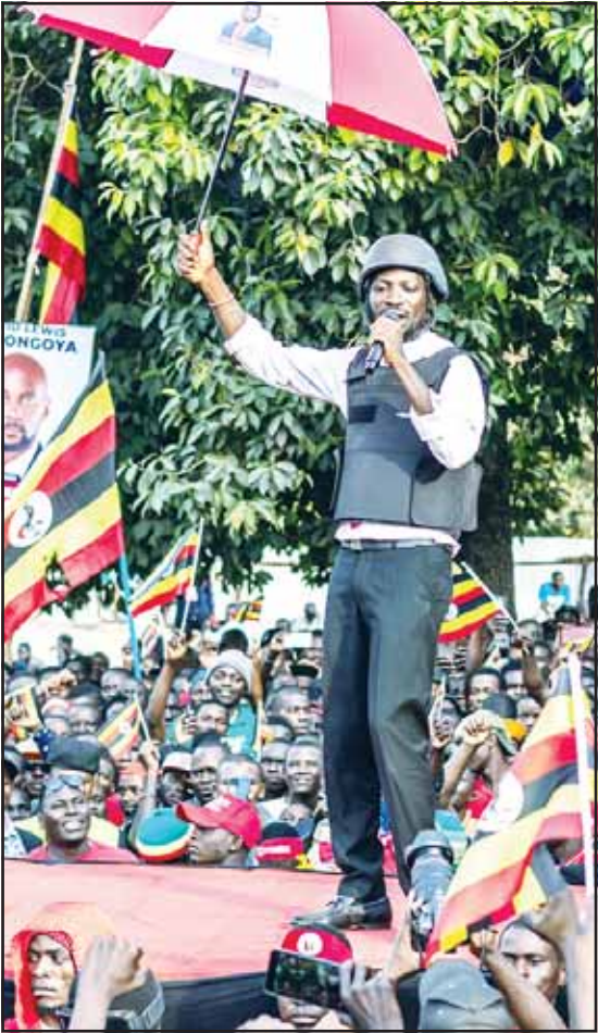
Uganda opposition presidential candidate Robert Kyagulanyi Ssentamu, known as Bobi Wine, addresses supporters during his final campaign rally in Kampala, Uganda, Jan. 12, 2026.