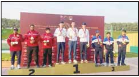
Medalists celebrate on the podium during the awarding ceremony at the Asian Amateur Skeet Shooting Finals in Doha.