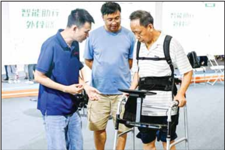
A visitor tries an exoskeleton robot during the World Smart Industry Expo 2025 in southwest China's Chongqing Municipality on Sept. 7, 2025. (Xinhua)

BEIJING, Jan 14, (Xinhua): China's central authorities have called for using advanced technologies, including brain-computer interfaces, exoskeleton robots and muscle suits, to assist elderly citizens with declining physical functions, according to guidelines made public Tuesday. Released by eight central departments including the Ministry of Civil Affairs, the document aims to drive the reform of elderly care services, improve the well-being of senior citizens, and fuel the growth of silver economy. The drive to bring technology into elderly care is already making a real difference. In east China's Zhejiang Province, Chen, in his sixties, who suffered left-sided hemiplegia following cerebral hemorrhage, regained the ability to pick up a cup with his left hand after undergoing training with non-invasive brain-computer interface technology in the hospital.