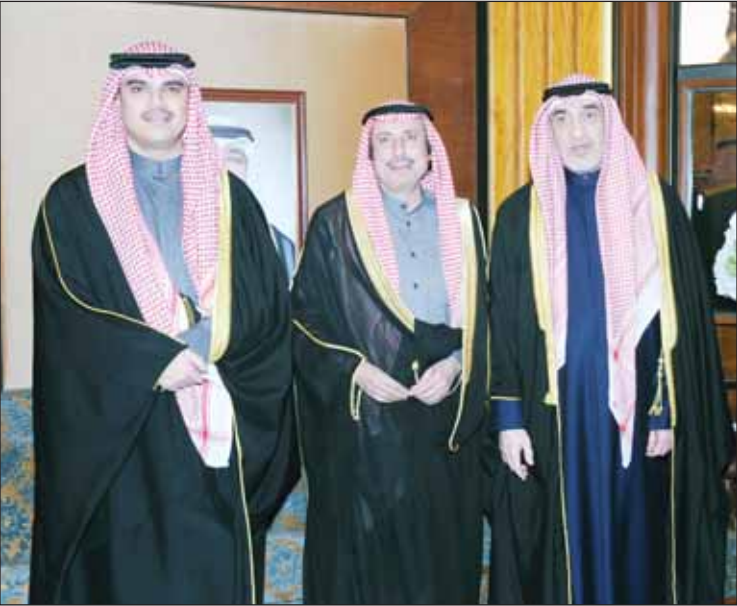
Sheikh Azzam Al-Sabah extending their congratulations.