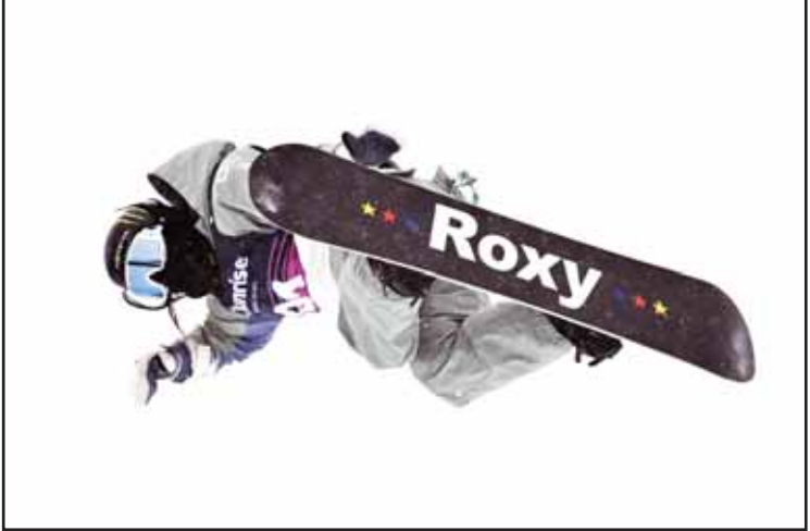
In this file photo, gold medalist Chloe Kim of USA in action during the Snowboard Halfpipe competition at the FIS Snowboard, Freestyle and Freeski World Championships in St. Moritz, Switzerland.

WASHINGTON, Jan 14, Snowboarder Chloe Kim says she’s “good to go” for the Milan Cortina Olympics despite tearing the labrum in her shoulder during a training run last week in Switzerland.