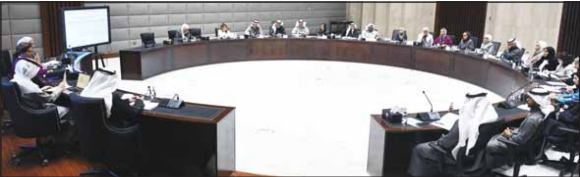
Part of the coordination meeting of the National Standing Committee for the Preparation of Reports and Follow-up on Recommendations Related to Human Rights.