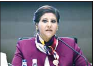
Ambassador Sheikha Jawaher Ibrahim Al-Duaij Al-Sabah, Assistant Foreign Minister for Human Rights Affairs

KUWAIT CITY, Jan 14, (KUNA): The National Standing Committee for the Preparation of Reports and Follow-up to Human Rights-Related Recommendations held a meeting on Wednesday to coordinate the preparation of the fourth national report of the International Covenant on Economic, Social and Cultural Rights (ICESCR). Assistant Foreign Minister for