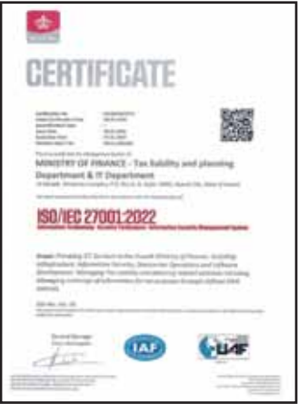
MoF ISO 27001 Certificate