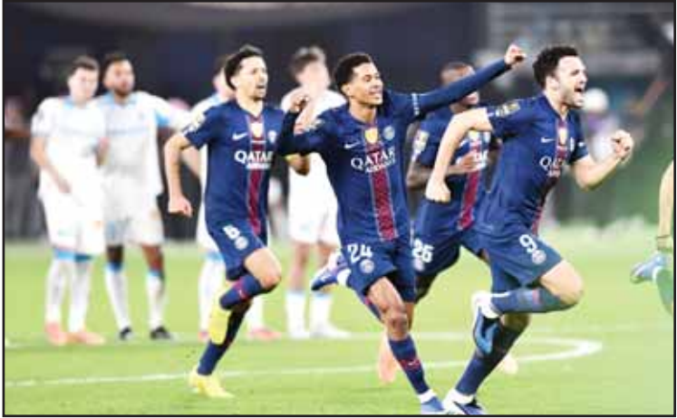
PSG's Goncalo Ramos, Senny Mayulu and Marquinhos, from right, celebrate after a penalty shootout to win the French Super Cup soccer match between PSG and Marseille in Kuwait City, Kuwait.

The third-tier Conference League paid Chelsea 21.8 million euros ($25.4 million) for winning the title. Chelsea is now in the Champions League.