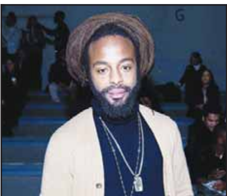
John Forte appears at the Fall 2013 Nanette Lepore Runway Show in New York on Feb. 13, 2013.

A native of New York City, Forté was a musical prodigy who broke through in his early 20s as a contributor to the Fugees' Grammy-winning "The Score" and to