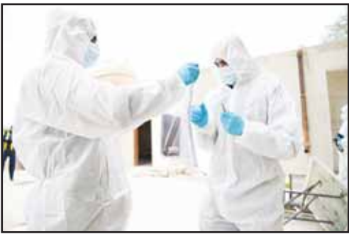
Hunting for evidence at a crime scene.

It is foolish to dwell excessively on regret over something that has passed and is over. Preserve your dignity, even if it means becoming a prisoner within the walls of your room. Nothing is sweeter than preserving your dignity.