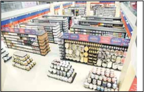
Photos during the event.

KUWAIT CITY, Jan 14: Zain Kuwait sponsored the second International Dasman Diabetes Summit (IDDS 2026), organized by Dasman Diabetes Institute, a center of the Kuwait Foundation for the Advancement of Sciences (KFAS). This support reflects Zain's commitment to advancing preventive healthcare, scientific research, and innovation, and to contributing to a more efficient and sustainable healthcare ecosystem by leveraging digital solutions and modern technologies in service of the community.