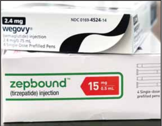
Boxes for the medications Wegovy and Zepbound are arranged for a photograph in California, May 8, 2025.

NEW YORK, Jan 14, Federal regulators on told drug-makers Novo Nordisk and Eli Lilly to remove label warnings about potential suicidal thoughts and behaviors from their blockbuster weight-loss medications. The US Food and Drug Administration said a comprehensive review "found no increased" risk related to suicide among users of the GLP-1 drugs for obesity, including Novo Nordisk's Wegovy and Saxenda and Eli Lilly's Zepbound. A preliminary review in January 2024 showed no link between the drugs and suicidal thought or actions, the FDA said. At that time, however, officials said they could not rule out that "a small risk may exist." The new analysis puts those concerns to rest.