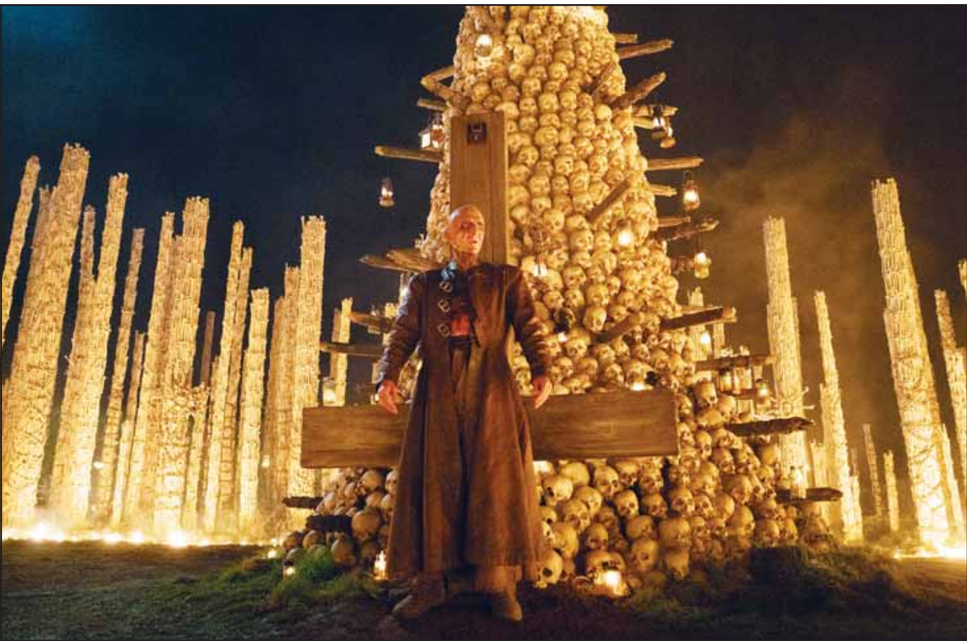
This image released by Sony Pictures shows Ralph Fiennes in a scene from '28 Years Later: The Bone Temple.'