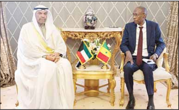
The Minister of Foreign Affairs meets with the Senegalese Minister of Integration and Foreign Affairs.