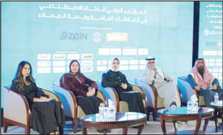
Panelists from the public and private sectors take part in a high-level discussion on artificial intelligence, digital communication, and customer service excellence during the conference.