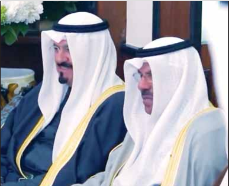
His Highness the Prime Minister Sheikh Ahmed Al-Abdallah and His Highness Sheikh Ahmed Al-Nawaf.