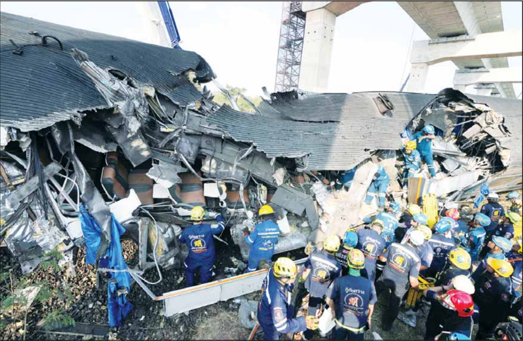
Rescuers work amidst wreckage after a construction crane fell onto a passenger train in Nakhon Ratchasima province, Thailand, Wednesday, Jan.14, 2026.