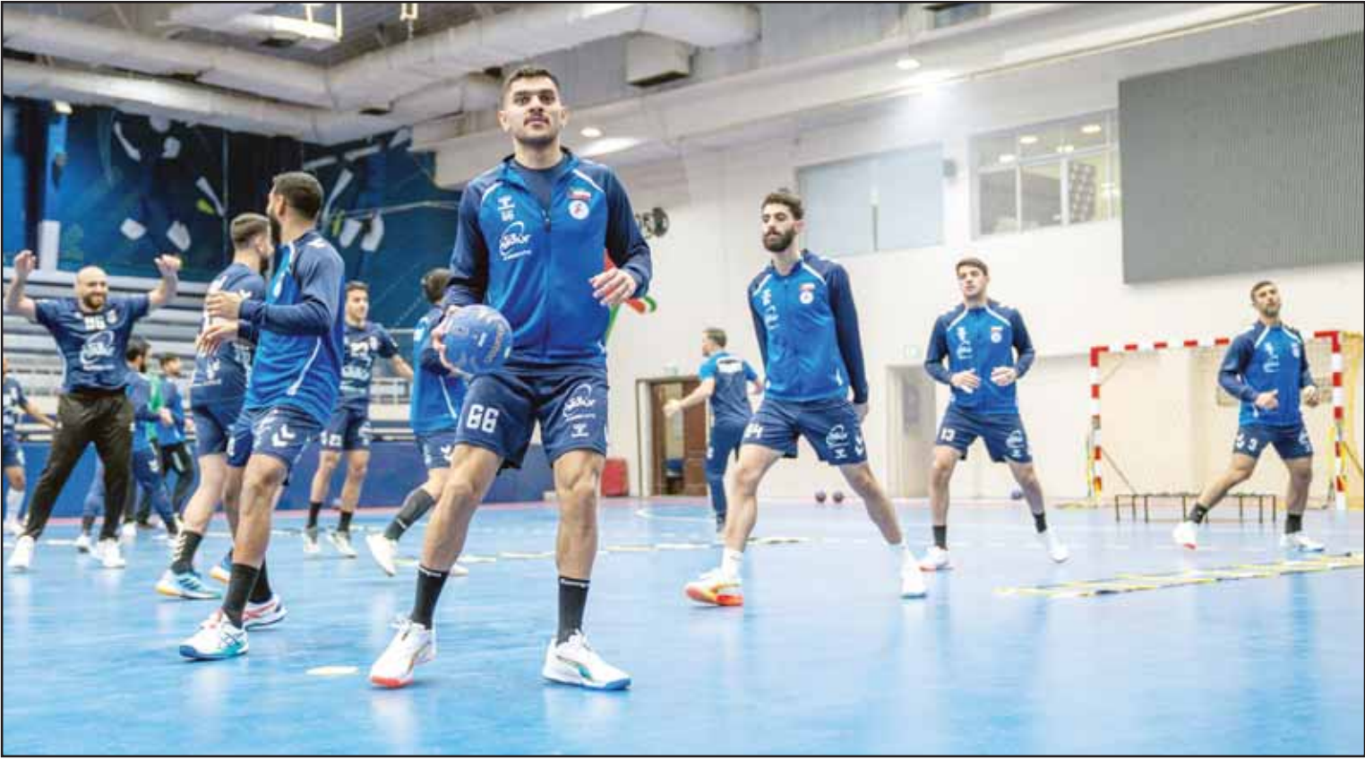
Kuwait players hold their final training session before the opener against India.