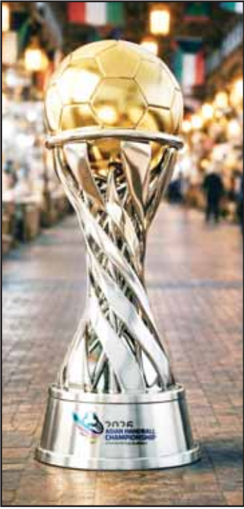
The 22nd Asian Men's Handball Championship trophy.

Four matches headline the opening day. Hong Kong face the UAE at 2:00 pm, followed by Australia versus Japan at 4:00 pm. Kuwait will then meet India at 6:00 pm, before