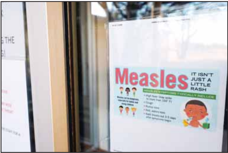
A sign is seen outside a clinic with the South Plains Public Health District, Feb. 23, 2025, in Brownfield, Texas.

NEW YORK, Jan 14, Health officials in South Carolina confirmed 124 new measles cases since Friday, as the outbreak in the northwestern part of the state balloons following the holidays. There is a second, separate measles outbreak along the Arizona-Utah border, where 418 people have been infected since August. Last year was the nation's worst year for measles spread since 1991, according to the Centers for Disease Control and Prevention. The US confirmed 2,144 cases across 44 states. Three people died, all of them unvaccinated.