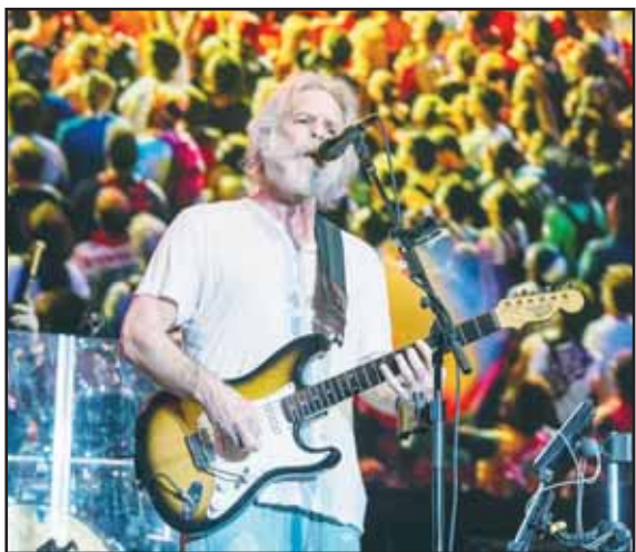
Bob Weir of Dead & Company performs at Bonnaroo Music and Arts Festival on Sunday, June 12, 2016, in Manchester, Tenn.