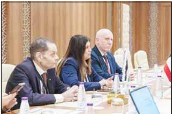
Kuwait Foreign Minister Abdullah Al-Yahya meets Palestinian Foreign Minister Dr. Varsen Shahin.