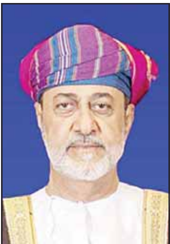
Haitham Bin Tareq Al-Saeed

KUWAIT CITY, Jan 11, (KUNA) : His Highness the Amir Sheikh Meshal Al-Ahmad Al-Jaber Al-Sabah sent a cable n Sunday to the Sultan of Oman Haitham bin Tareq, congratulating him on the anniversary of his throne assumption. In his cable, His Highness the Amir praised the Sultanate's comprehensive development accomplishments covering various domains under the Sultan's leadership. His Highness the Amir commended the historical and fraternal relations between both countries and peoples, underlining permanent and joint interest in promoting and developing horizons of existing cooperation at all levels. His Highness the Amir also wished the Sultan of Oman good health and the Sultanate and its people further progress and prosperity under his wise leadership.