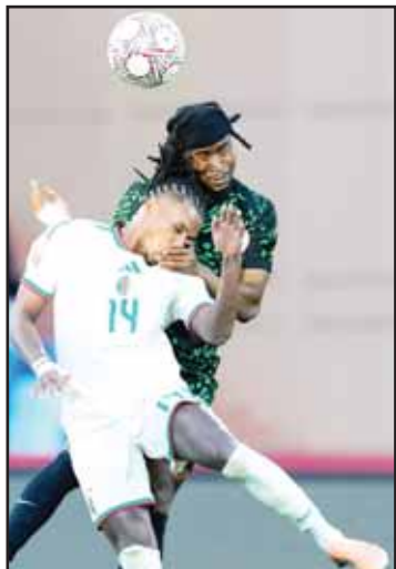
Nigeria's Ademola Lookman, top, and Algeria's Hicham Boudaoui challenge for the ball during the Africa Cup of Nations quarterfinal soccer match between Nigeria and Algeria, in Marrakech, Morocco.

"We just fight for our country and hopefully we go through the next game as well," Salah said. "It's (a)