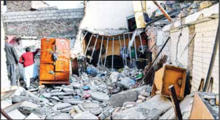
Government officials survey the damage of a home caused by a gas cylinder explosion hours after a wedding reception, in Islamabad, Pakistan, Sunday, Jan. 11, 2026.

were killed when a car collided with a truck in Pakistan's northwestern Khyber Pakhtunkhwa province, rescue officials said on Sunday. The accident occurred on Saturday night in Khyber district after the car, reportedly travelling at high speed, crashed head-on into a truck coming from the opposite direction, a spokesperson of the state-run Rescue 1122 told Xinhua. ISLAMABAD: Pakistan Navy on Saturday carried out a successful test-firing of a surface-to-air missile, demonstrating a range of conventional and unmanned warfare capabilities in the north Arabian Sea, the military said. The Inter-Services Public Relations (ISPR), the media wing of the Pakistani military, said in a statement that the exercise underscored the navy's operational readiness and combat preparedness in line with the evolving requirements of modern naval warfare.