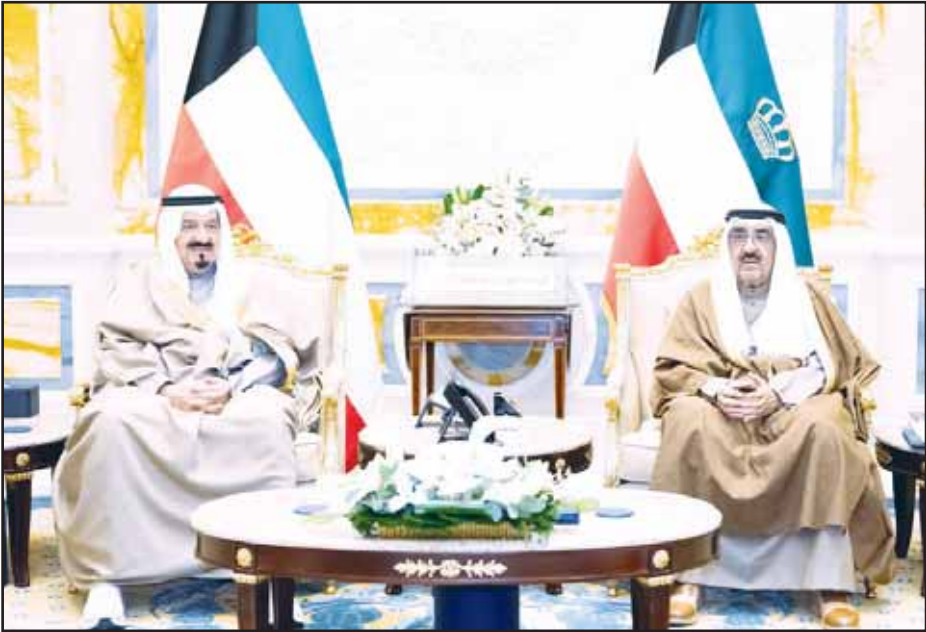
Left to right: His Highness the Amir Sheikh Meshal Al-Ahmad Al-Jaber Al-Sabah receives His Highness the Crown Prince Sheikh Sabah Khaled Al-Hamad Al-Sabah and His Highness the Prime Minister Sheikh Ahmad Abdullah Al-Ahmad Al-Sabah.