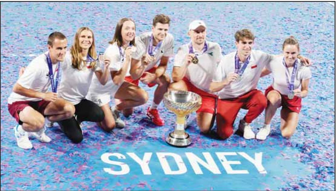
Team members from Poland celebrate with their trophy after defeating Switzerland in the final at the United Cup tennis tournament in Sydney.