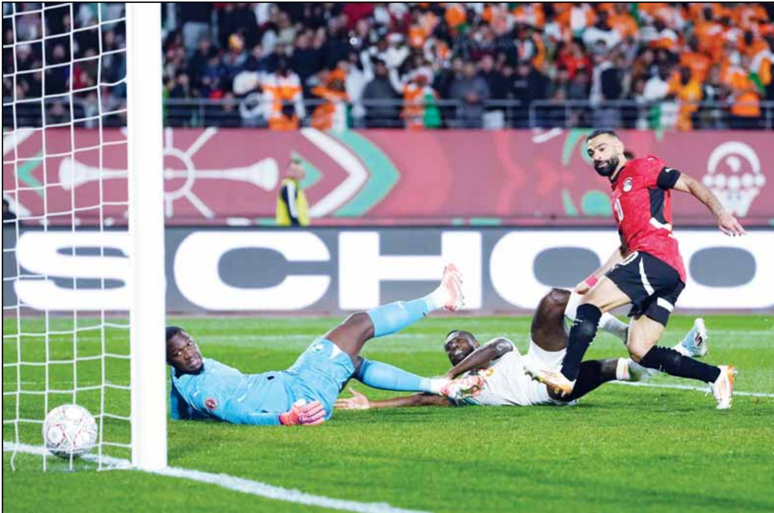
Egypt's Mohamed Salah, right, scores his side's third goal during the Africa Cup of Nations quarterfinal soccer match between Egypt and Ivory Coast, in Agadir, Morocco.

They needed patience in Marrakech against the team with the best defense in the tournament after