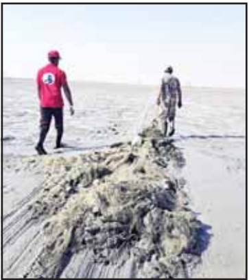
The Kuwaiti diving team launches a major campaign to clean Kuwait Bay and protect it from pollutants.

zens and residents to play an oversight role and report any observed environmental violations. Al-Fadhil also urged sea-goers and nature enthusiasts to protect wildlife and refrain from disturbing migratory birds at their resting sites, stressing the need to comply with fishing bans inside the bay. He warned against the use of prohibited fishing nets that turn into so-called "ghost nets," which devastate fish stocks and damage the seabed for years, calling for urgent action to remove abandoned and anchored vessels in the Ashairij area due to their negative impact on the landscape, navigation safety, coastal soil and pollution levels. Al-Fadhil thanked the supporting government entities, emphasizing that coordinated institutional and community efforts are the only way to preserve Kuwait Bay as a national environmental heritage for future generations.