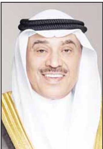
Sheikh Sabah Khaled