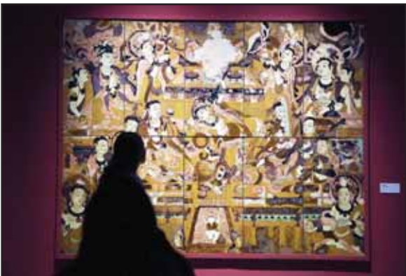
A person visits the ‘Dunhuang in Glazes’ exhibition at the Jiangxi provincial art museum in Nanchang, east China’s Jiangxi Province, Dec. 19, 2025.