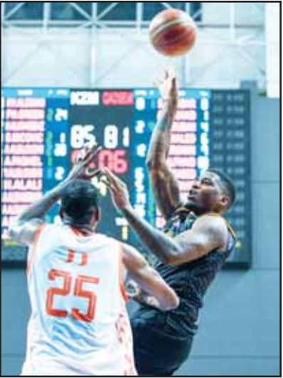
Al-Qadsia fires at hoop in last clash with Kazma.