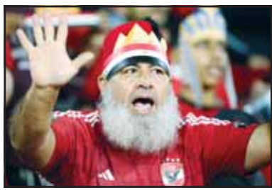
A supporter cheers before the Africa Cup of Nations quarterfinal soccer match between Egypt and Ivory Coast in Agadir, Morocco.