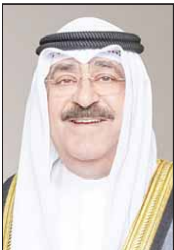
Sheikh Mishal Al-Ahmad