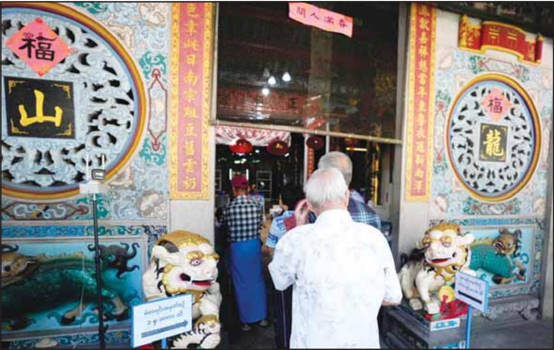
Voters line up to cast ballot at a polling station during the second phase of general election Sunday, Jan. 11, 2026, in Yangon, Myanmar.

Critics say the polls organized by the military government are neither free nor fair and are an effort by the military to legitimize its rule after seizing power from the elected government of Aung San Suu Kyi in February 2021. On Sunday, people in Yangon, the country's largest city, and Mandalay, the second-largest, were casting their ballots at high schools, government buildings and religious buildings. At more than 10 polling stations visited by Associated Press journalists in Yangon and Mandalay, voter numbers ranged from about 150 at the busiest site to just a few at others, appearing lower than during the 2020 election when long lines were common.