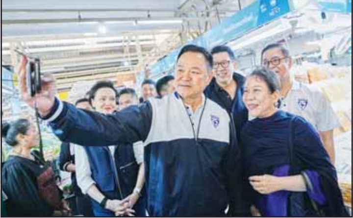
Thailand's Prime Minister and leader of Bhumjaithai Party Anutin Charnvirakul, front left, takes a selfie with a supporter during an election campaign in Bangkok, Thailand, Sunday, Jan. 11, 2026.

(Xinhua) Australia extends emergency fundings: Over 300 structures have been destroyed in the ongoing bushfire crisis in the southeast Australian state of Victoria, authorities said on Sunday as they announced support for affected communities. Prime Minister Anthony Albanese and the Premier of Victoria, Jacinta Allan, on