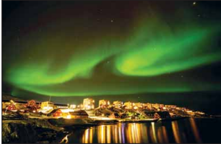
The northern lights appear over homes in Nuuk, Greenland, on Feb. 17, 2025.

our presence in the Arctic, and we don’t yet have the right strategy or vision to do so,” he said. If the U.S. took control of Greenland by force, it would plunge NATO into a crisis, possibly an existential one. While Greenland is the largest island in the world, it has a population of around 57,000 and doesn’t have its own military. Defense is provided by Denmark, whose military is dwarfed by that of the U.S. It’s unclear how the remaining members of NATO would respond if the U.S. decided to forcibly take control of the island or if they would come to Denmark’s aid. “If the United States chooses to attack another NATO country militarily, then everything stops,” Frederiksen has said. Trump said he needs control of the island to guarantee American security, citing the threat from Russian and Chinese ships in the region, but “it’s not