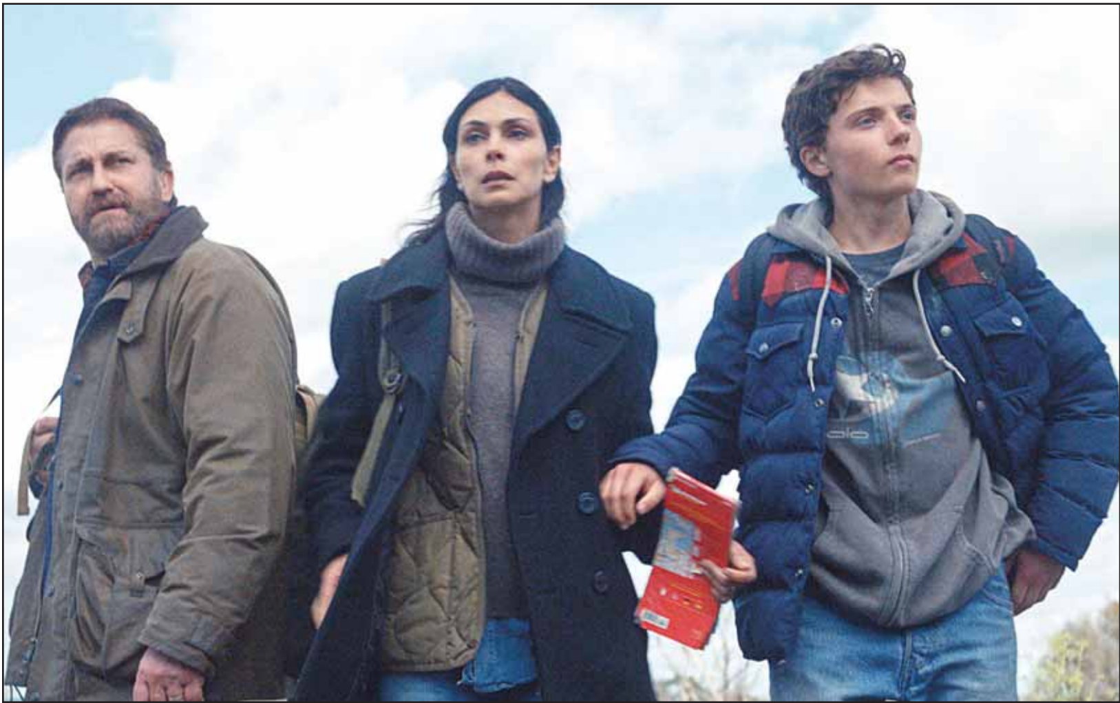
This image released by Lionsgate shows Gerard Butler, from left, Morena Baccarin, and Roman Griffin Davis in a scene from 'Greenland 2: Migration.'