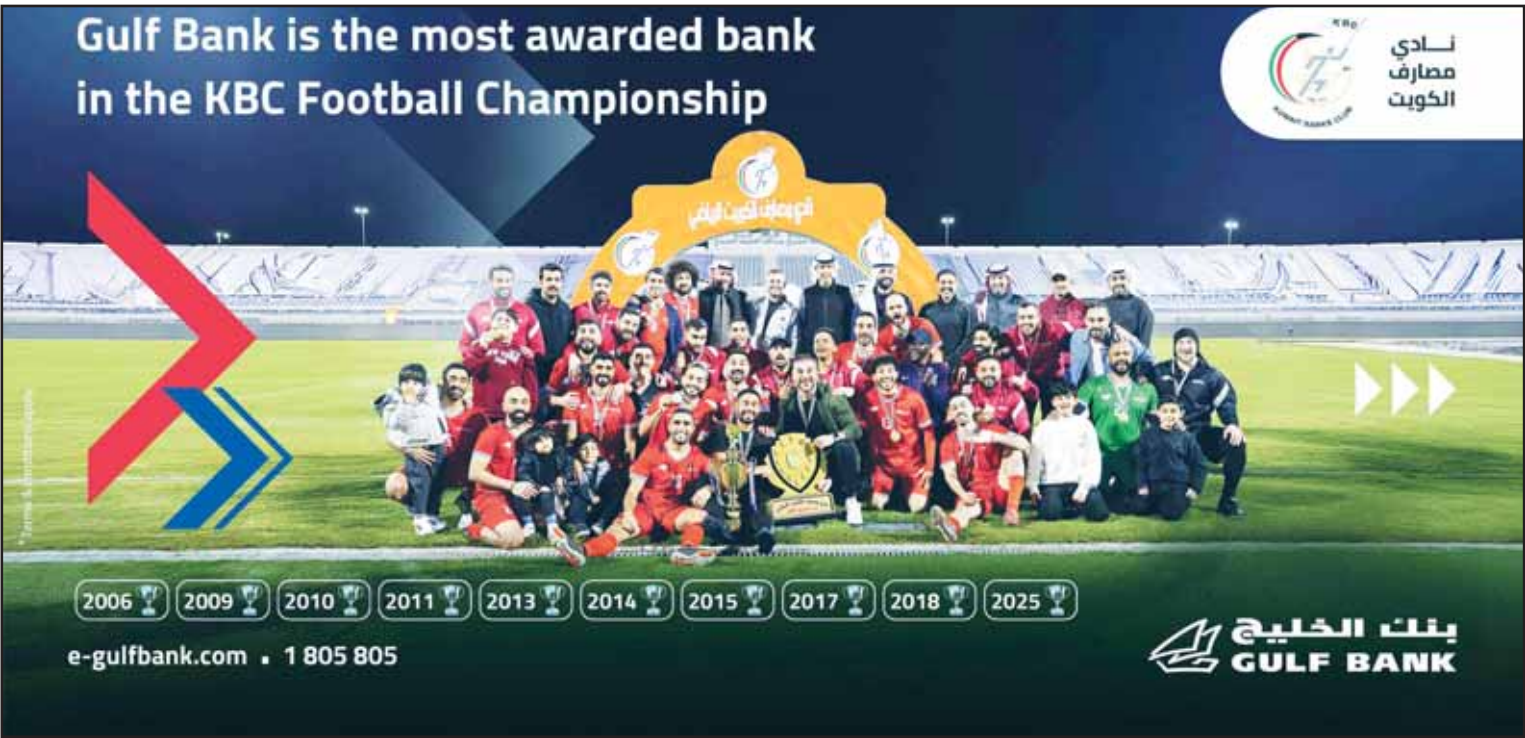
The Gulf Bank team posed for a group photo after securing the Kuwait Banks Club Football League title.

confirms its continued strong presence in football tournaments dedicated to the banking sector. Gulf Bank places great importance on supporting sports and promoting a culture of physical activity, driven by its belief in the role of sports in improving quality of life and fostering a healthy lifestyle within the community. The bank is keen to encourage its employees and members of the community to engage in sports by supporting various tournaments and sporting events. In this context, Gulf Bank organizes the Gulf Bank Marathon annually, one of the most prominent community sporting events in the State of Kuwait. The marathon attracts thousands of participants from different age groups and aims to raise awareness of the importance of physical activity and making it a daily lifestyle choice. This initiative aligns with the bank’s strategy to reinforce social sustainability standards, focusing on supporting health and sports initiatives and enhancing positive engagement with the community. The Gulf Bank football team presents a distinguished model of teamwork and cooperation among employees, comprising a group of