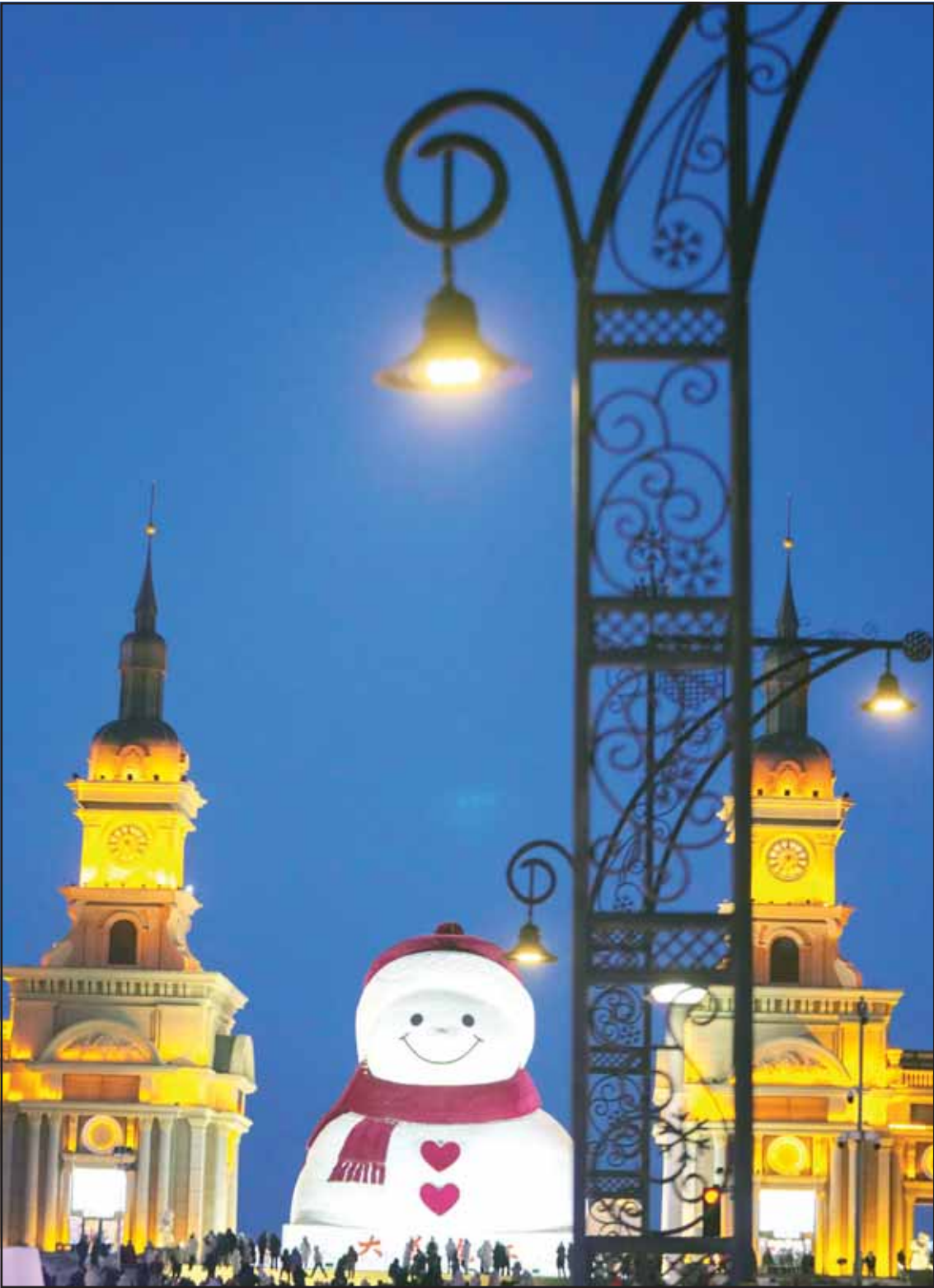
Tourists take photos of the iconic giant snowman at the Qunli music park in Harbin, northeast China's Heilongjiang Province, Jan. 10, 2026. Standing 19 meters tall, measuring 14 meters in length and 11 meters in width, the snowman was dug and carved out of over 3,500 cubic meters of snow, with tourists swarming to take pictures of its classic red scarf and round face.