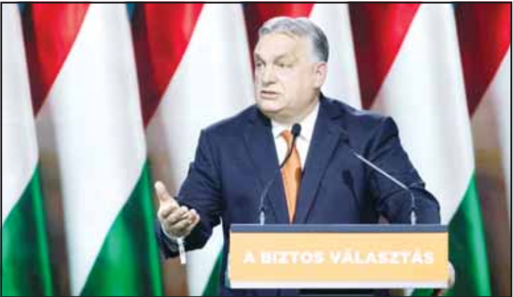
Hungarian Prime Minister Viktor Orban speaks at the Fidesz party's 31st congress in Budapest, Hungary, Jan. 10, 2026. Orban said on Saturday that he is ready to lead the ruling party alliance in the upcoming parliamentary election.