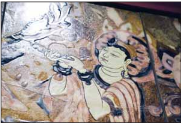
This photo taken on Dec. 19, 2025 shows a ceramic artwork related to Dunhuang murals during the ‘Dunhuang in Glazes’ exhibition.