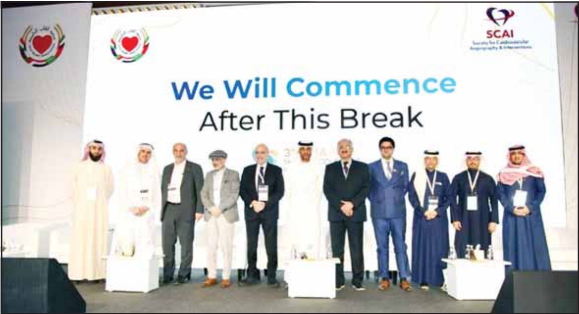
Kuwait hosts the third edition of the Cardiac Shock Conference.