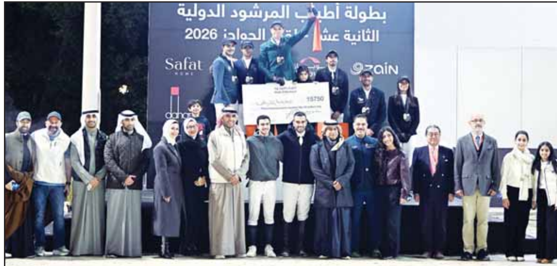
Grand Prix winners on the podium.