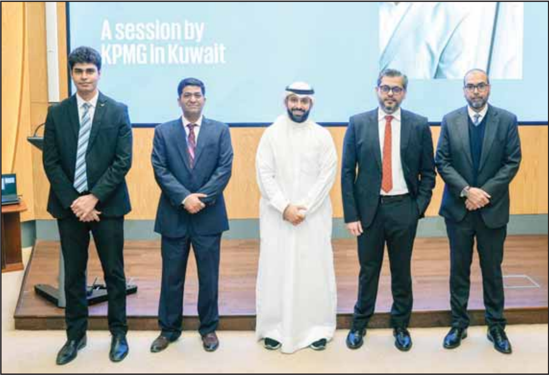
Boursa Kuwait, CFA Society, and KPMG Kuwait highlight key IFRS and tax developments impacting listed companies.

During the session, experts underscored the law’s requirement that large multinational enterprises (MNEs) with consolidated global revenues of at least €750 million in two of the previous four years pay a minimum effective tax rate of 15% on their Kuwait-sourced prof-