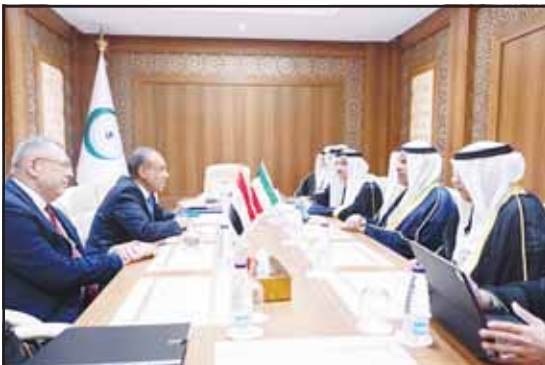
Kuwait Foreign Minister Abdullah Al-Yahya meets his Egyptian counterpart Badr Abdulaaty.