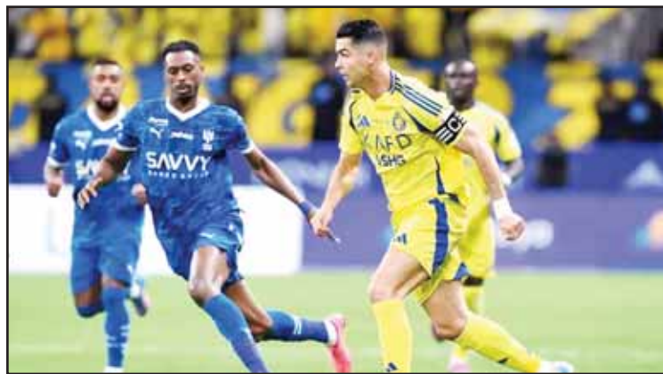
In this file photo, Cristiano Ronaldo (right) vies for the ball not pictured with Al-Hilal player.

Both teams will miss key players due to international duty: Al-Hilal are without Moroccan goalkeeper Yassine Bounou and Senegalese defender Kalidou Koulibaly, while Al-Nassr will be without Senegalese forward Sadio Mané, all participating in the Africa Cup of Nations.