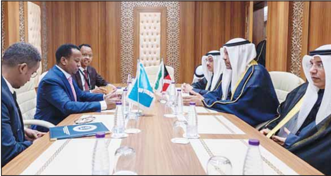
Kuwait Foreign Minister Abdullah Al-Yahya meets his Somali counterpart Abdisalam Abdi Ali.

The case dates back to June of last year, when a major fire erupted in a building used to house workers in Manqaf. The blaze led to the death of 49 workers and injured a comparable number -- mostly Indian nationals. The incident was among the most serious the country experienced in recent years. The defendants faced charges including manslaughter, perjury, negligence, facilitating the escape of fugitives, and causing injury through negligence.