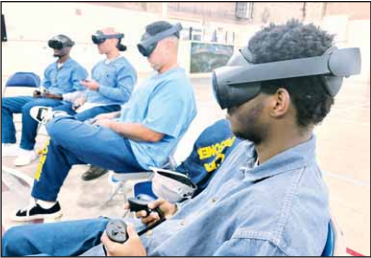
Incarcerated men use virtual reality headsets inside Valley State Prison in Chowchilla, Calif., Dec. 11, 2025.