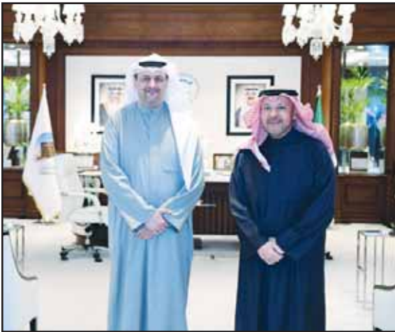
Farwaniya Governorate photo

KUWAIT CITY, Jan 11, (KUNA): The Minister of Defence, Sheikh Abdullah Ali Abdullah Al-Salem Al-Sabah, and his accompanying delegation departed for Italy on an official visit, said Defence Ministry press statement.