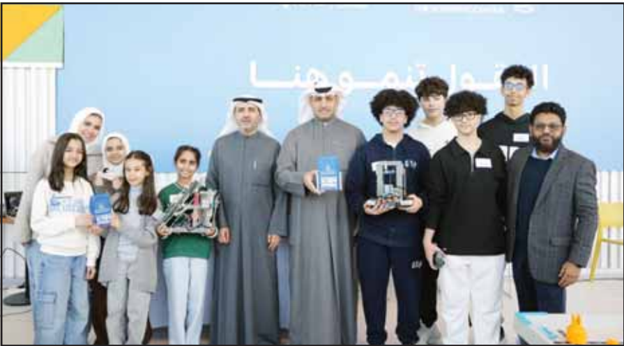
Participants and organizers pose for a group photo during the robotics training competitions hosted by The Scientific Center of Kuwait, ahead of the Kuwait National Robotics Championship.