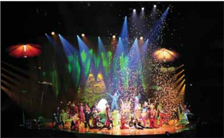
Acrobats from Cirque du Soleil rehearse for the show entitled ‘Ovo’ at The Royal Albert Hall, in London.

vanced information systems to support research, and assigning International Standard Book Numbers (ISBNs) to all publications issued in Kuwait. The library’s new building was designed to house more than one million volumes and currently contains tens of thousands of books, references, manuscripts, and periodicals. Kuwait National Library launched the “Memory of a Nation” project to digitally preserve rare books, documents, stamps, and coins, ensuring protected and modern access to cultural heritage for researchers and the public.