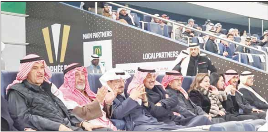
His Highness the Crown Prince Sheikh Sabah Khaled Al-Hamad Al-Sabah and His Highness the Prime Minister Sheikh Ahmad Abdullah Al-Ahmad Al-Sabah.