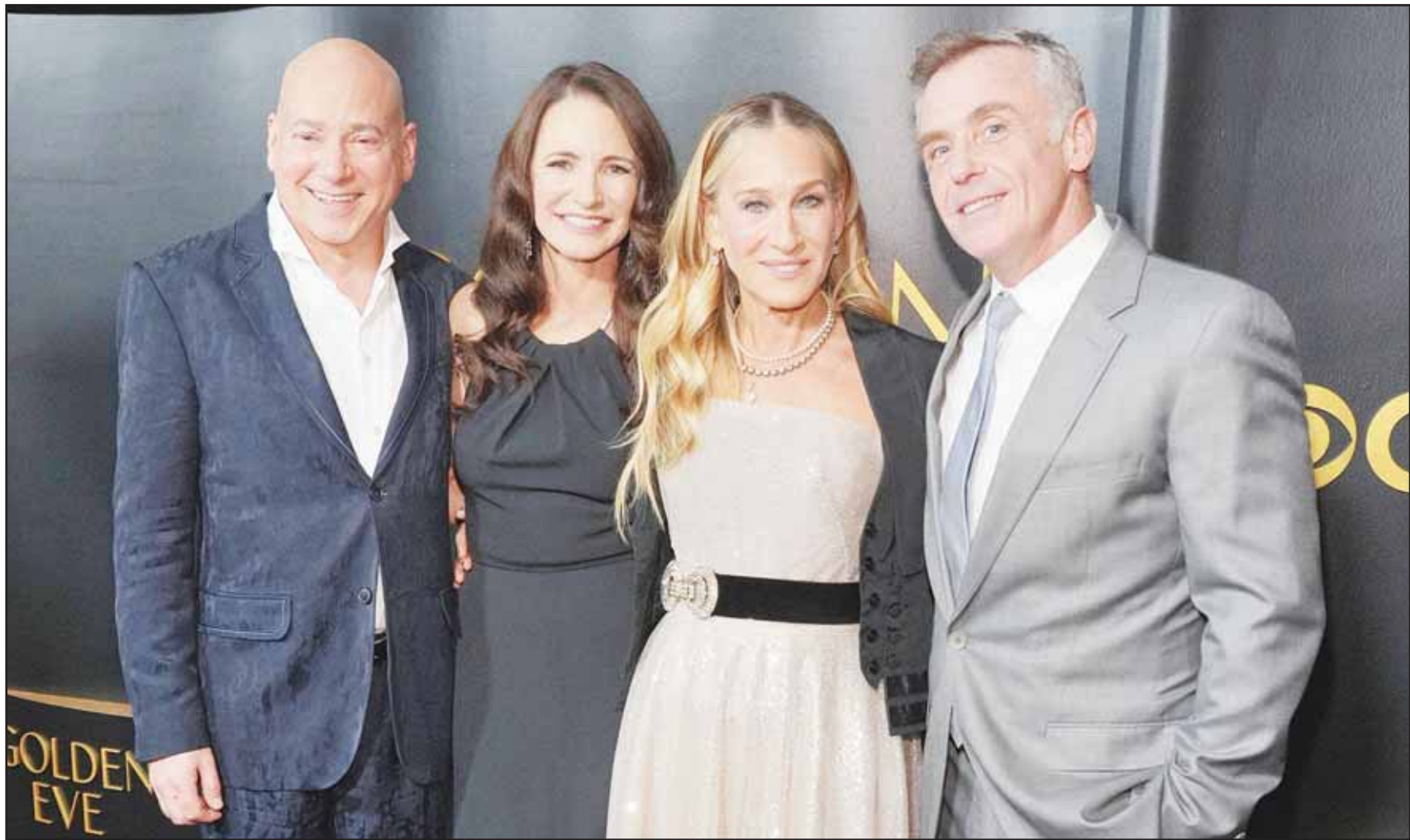
Evan Handler, from left, Kristin Davis, Sarah Jessica Parker and David Eigenberg arrive at the Golden Globes Golden Eve at The Beverly Hilton Hotel, in Beverly Hills, Calif.