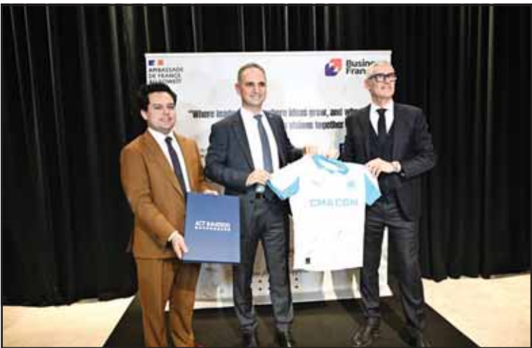
Some pictures taken during the event.