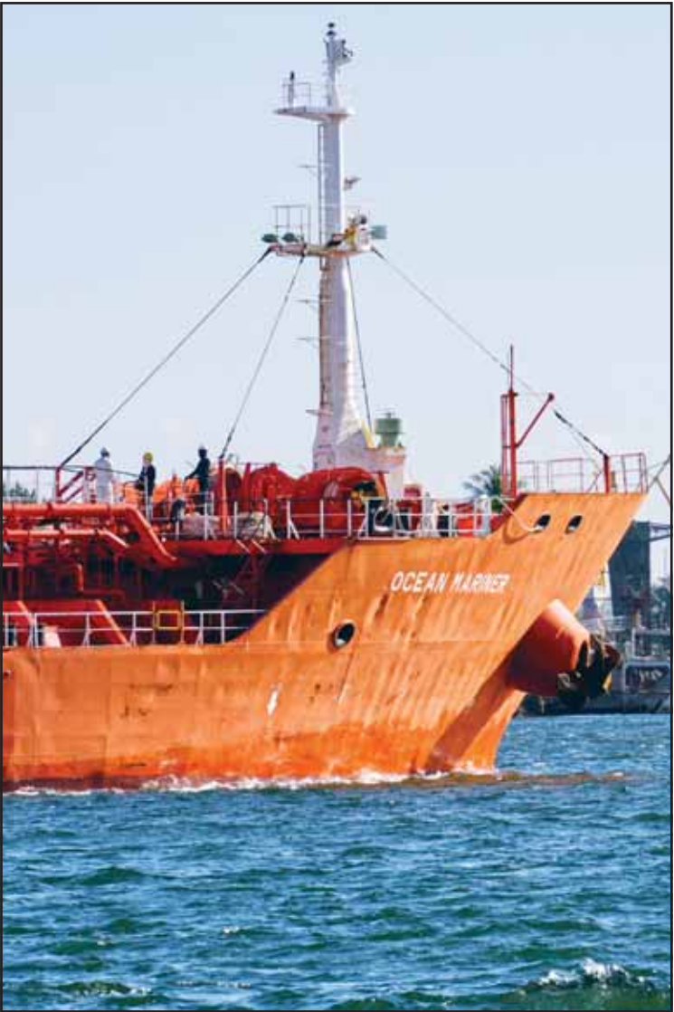
The oil tanker Ocean Mariner, Monrovia, arrives to the bay in Havana, Cuba, Friday, Jan. 9, 2026.