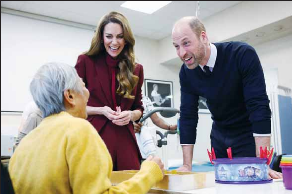
Britain's Prince William and Britain's Kate, Princess of Wales, speak to a patient at the therapy gym during a visit to Charing Cross Hospital, in London, England, Thursday, Jan. 8, 2026. (AP)

As the storm moved across the United Kingdom, it collided with an existing mass of Arctic air, bringing snow to northern areas and heavy rain to the south. That extended the misery in northern Scotland, where snowplows have been working overtime to keep roads open after more than a half-meter (around 20 inches) of snow fell earlier in the week. More than 250 schools across Scotland were closed on Friday, with some remaining shut for a fifth straight day. National Rail warned people across the U.K. to check before traveling, because the storm had disrupted services across England, Scotland and Wales. Birmingham Airport, which closed briefly because of snow, said that it had reopened with "reduced runway operations." The disruptions came after the Met Office, Britain's national weather service, issued a rare red weather warning - its highest - in southwestern England for Thursday evening. Red warnings are issued when the forecaster considers it "very likely" that there will be life-threatening conditions. (AP)