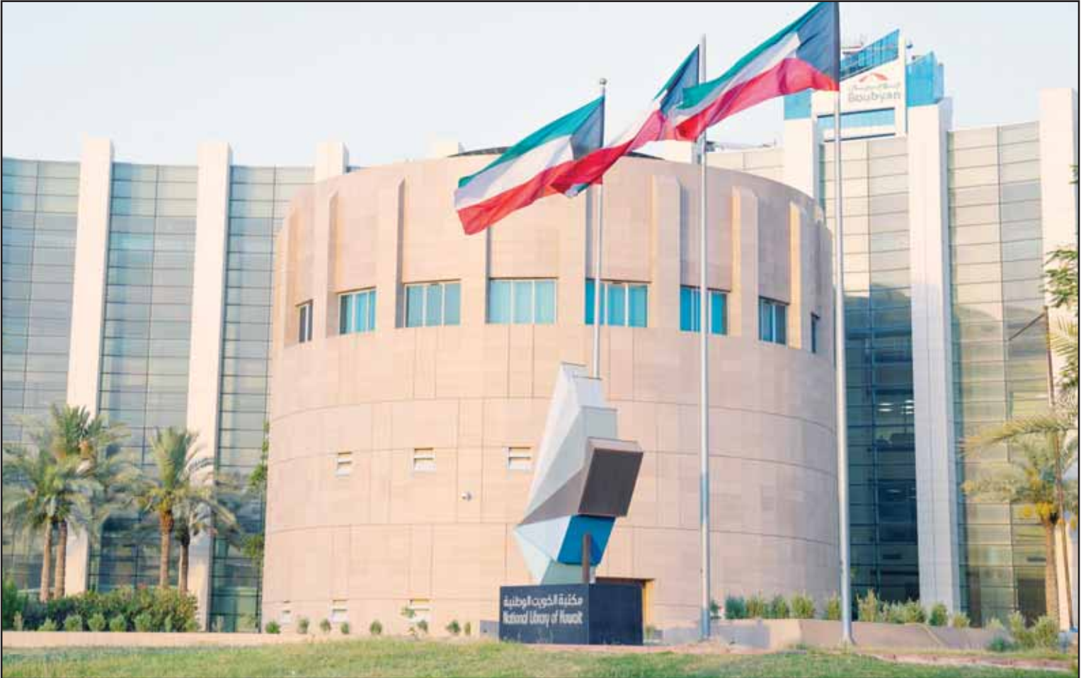
Kuwait National Library building

KUWAIT CITY, Jan 10, (KUNA): Kuwait National Library stands as the country’s living memory, preserving its history and intellectual heritage while serving as a key center for research and intellectual property protection. The library was founded in 1923 as the Public Library during the rule of late Amir Sheikh Ahmad Al-Jaber Al-Sabah and evolved through several names over the decades. It later became the Library of Public Information in 1936, a name it retained until 1957. Subsequently, it was known as the Main Informa-