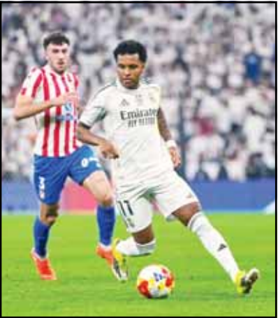
Real Madrid's Rodrygo runs with the ball next to Atletico Madrid's Matteo Ruggeri during the Spanish Super Cup semifinal soccer match at King Abdullah Sports City Stadium in Jeddah, Saudi Arabia.

That means either Dean Huijsen or Aurelien Tchouameni is likely to partner Raul Asencio in central defense. There is also uncertainty over whether Kylian Mbappe will