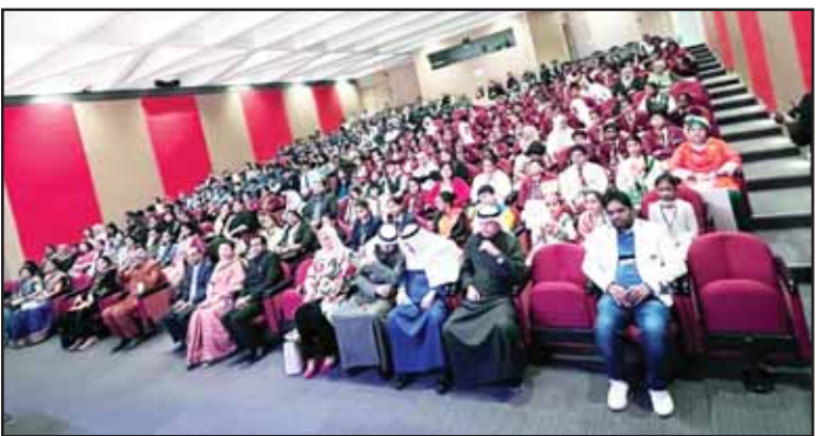
Top and above: Photos from the event

its cultural and historical importance. Hindi holds a crucial place not only in India but also on the global stage, with a vast diaspora of Hindi speakers worldwide. 4. The Embassy of India in Kuwait has been instrumental in promoting Hindi