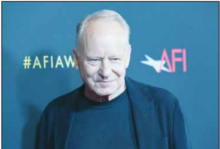
Actor Stellan Skarsgard arrives at the AFI Awards at the Four Seasons in Los Angeles.

BEVERLY HILLS, Calif., Jan 10, If the American Film Institute Awards stands for anything, it's that everyone in the room - from Leonardo DiCaprio and Ryan Coogler to Timothée Chalamet and Ariana Grande - leaves feeling like a winner.