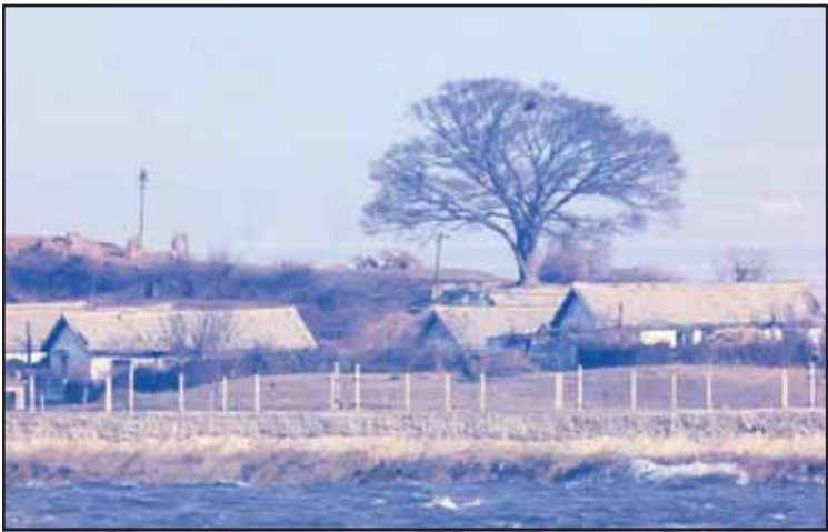
North Korea’s Kaepoong village is seen from Ganghwa, South Korea, near the border with North Korea, Saturday, Jan. 10, 2026.

“We strongly denounce the hooligans’ serial outrageous encroachment upon our sovereignty and undisguised provocative acts against us,” the North Korean statement said. “The ROK military warmongers will be surely forced