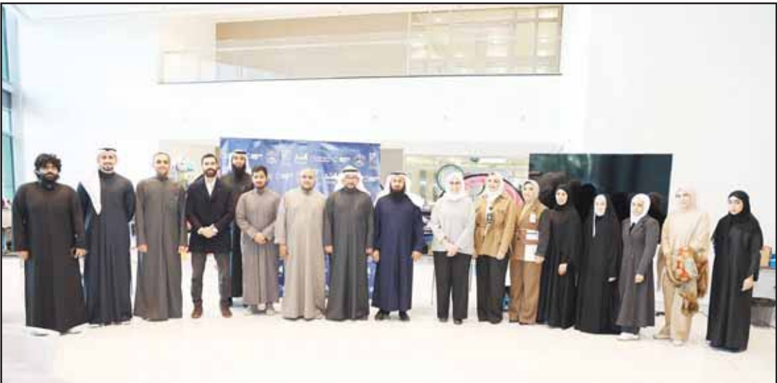
Program supports clean energy and hydrogen fuel cell education.