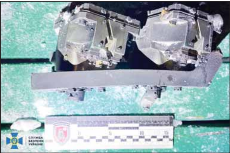
This photo provided by the Ukrainian Security Service on Friday, Jan. 9, 2026, shows a fragment believed to be a part of a Russian Oreshnik intermediate range hypersonic ballistic missile that hit the Lviv region.