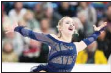
Amber Glenn competes during the women’s free skating competition at the U.S. Figure Skating Championships in St. Louis.