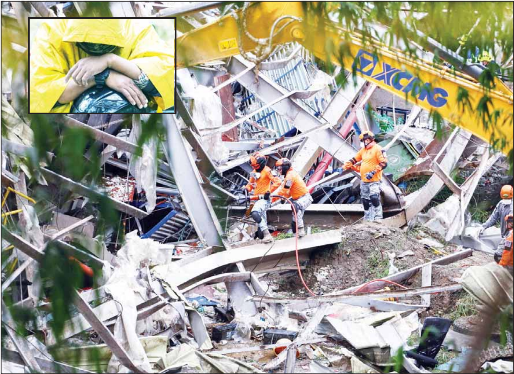
Rescuers continue operations on a collapsed waste segregation facility in Binaliw, Cebu city, central Philippines on Saturday, Jan. 10, 2026. Inset: A woman waits as rescuers continue operations on a collapsed waste segregation facility in Binaliw, Cebu city, central Philippines on Saturday. (AP)

He added that measles and other vaccine-preventable diseases are resurging as immunization coverage has fallen below 50 percent amid the collapse of the health system. Pires also highlighted the use of sexual violence as a weapon of war placing millions of children at risk, with survivors including children as young as one year old.