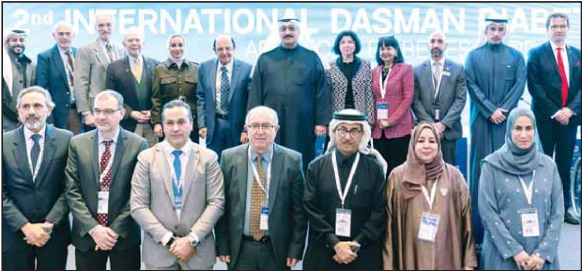
Health Minister joins participants for a group photo.

The minister also touched upon the national vision on building a more effective and sustainable health system, amid new research papers mainly with the AI development.