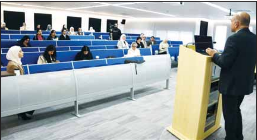
KU Health Sciences Center hosts a translational medicine workshop, featuring international neuroscience experts and interactive sessions to advance medical research and healthcare.