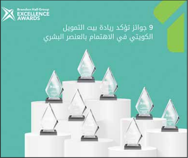
Brandon Hall award

KFH has been named the MENA's Most Innovative Private Bank for 2025 at