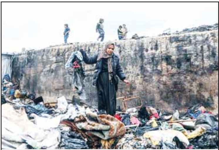
A displaced Palestinian woman inspects the damage to her temporary tent after a fire broke out in Gaza City.

through a variety of initiatives and events throughout the year, such as competitions, workshops, and cultural programmes, which have fostered a deeper appreciation of the language among local communities and the Indian diaspora.