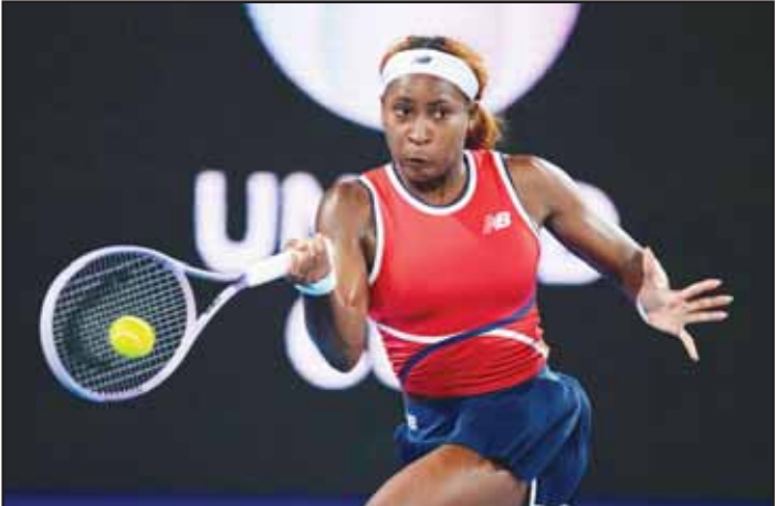
Coco Gauff of the U.S. hits a forehand to Iga Swiatek of Poland during their semifinal match at the United Cup tennis tournament in Sydney.

Earlier, Bencic extended her undefeated season-opening singles streak when she beat Mertens 6-3, 4-6, 7-6 (0) to put Switzerland ahead 1-0. But Stan Wawrinka, who will retire at the end of this season, was beaten 6-3, 6-7 (4), 6-3 by Bergs to send the match to a mixed doubles decider at Ken Rosewall Arena.