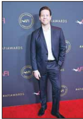
Actor Ike Barinholtz arrives at the AFI Awards at the Four Seasons in Los Angeles.