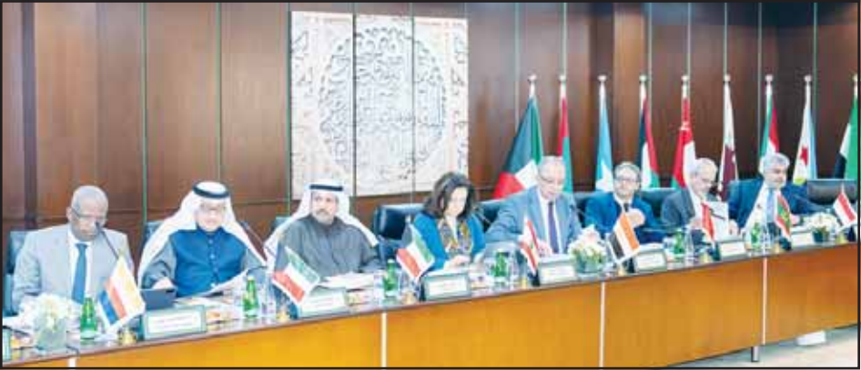
Representatives of the Arab countries, members of the Board of Trustees of the Arab Planning Institute, attended the first meeting of the year 2025-2026.