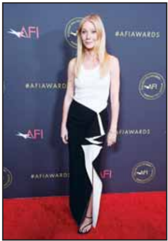
Gwyneth Paltrow arrives at the AFI Awards at the Four Seasons in Los Angeles.