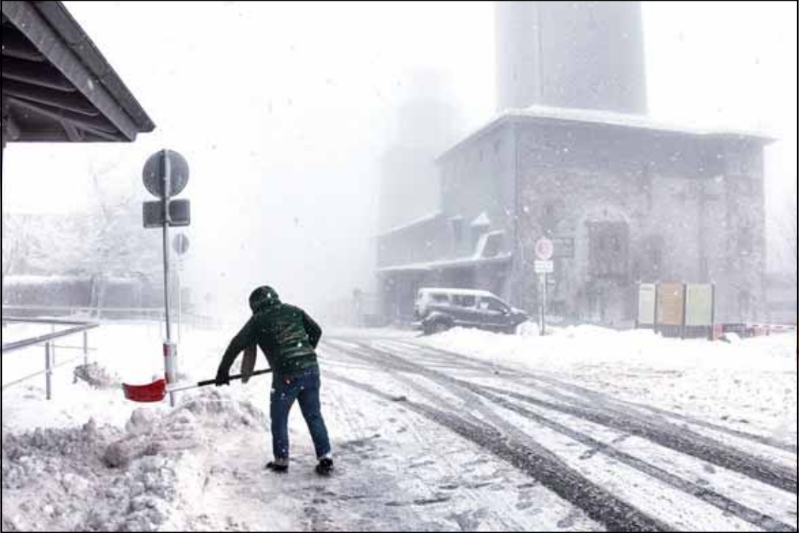
Left: A woman clears snow from a road on top of the Feldberg mountain near Frankfurt, Germany, Saturday, Jan. 10, 2026. Right: A fallen tree in Falmouth, south west England, Friday Jan. 9, 2026, as storm Goretti continues to batter the UK with people across the country facing widespread power cuts, travel disruption and school closures. (AP)

Thousands of homes and businesses across northern France and southern England were without power Friday morning and residents faced widespread travel delays after a storm swept in off the Atlantic, bringing high winds, rain and snow to the region. The low-pressure system, named Storm Goretti, pummeled the Isles of Scilly overnight, with wind gusts up to 99 mph (159 kph) recorded in the archipelago off the southwestern tip of England. Local government officials reported blocked roads, unstable buildings and power outages that left some people without water. More than 57,000 were without power across southwestern England, the Midlands and Wales, according to National Grid, which runs the country's electricity transmission network.