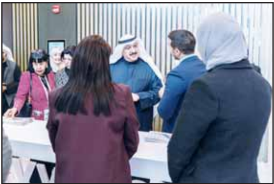
A view of the exhibition held on the sidelines of the conference.