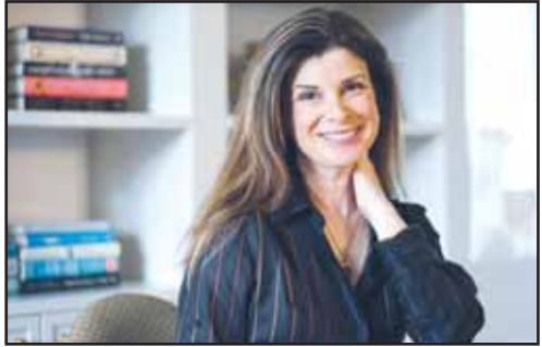
Author Laura Dave poses for a portrait in Santa Monica, Calif.

Dave: We're so different in our process. He'll show me things immediately while he's writing them. He will show me new scenes because especially with screenwriting, and certainly with TV writing, there's so much collaboration. So, you do it that way. I'm more like, I have to sort of be in my hole and get to the end and then get feedback. He's my best reader and my first reader. I love talking about story with him and character. I'm a really big fan of his writing. I don't know that I could be married to a writer if I didn't feel like they're the best writer around, and that's how I feel about him.