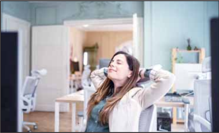
It's not hard to breathe easy at home.

Government regulations limit the amount of chemicals allowed in some kinds of consumer products, such as adhesives and construction materials,