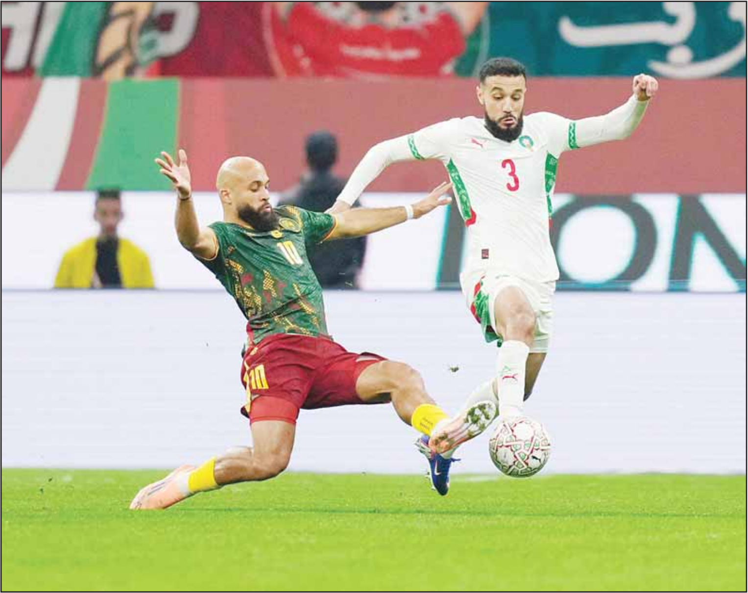
Morocco's Noussair Mazraoui, right, is challenged by Cameroon's Bryan Mbeumo during the Africa Cup of Nations quarterfinal soccer match between Cameroon and Morocco, in Rabat, Morocco.