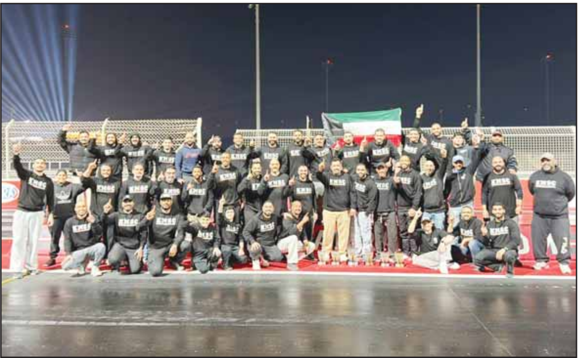
Kuwaiti Club racers celebrate their podium finishes at the third round of the 2025-2026 Bahrain Drag Racing Championship at Bahrain International Circuit.