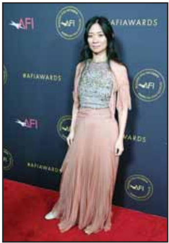
Director Chloe Zhao arrives at the AFI Awards at the Four Seasons in Los Angeles.