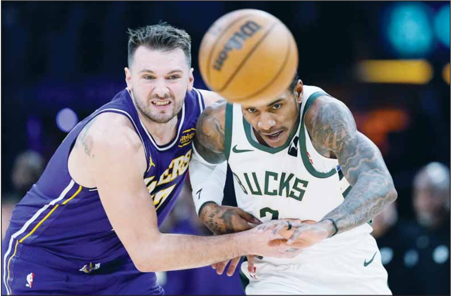
Los Angeles Lakers guard Luka Doncic, left, and Milwaukee Bucks guard Kevin Porter Jr. go after a loose ball during the first half of an NBA basketball game in Los Angeles.

Jimmy Butler added 15 points, six assists and six rebounds as the Warriors finished with a season-best 39 as-