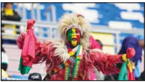
A Senegal fan cheers for his national team ahead of the start of the Africa Cup of Nations quarterfinal soccer match between Senegal and Mali in Tangier, Morocco.