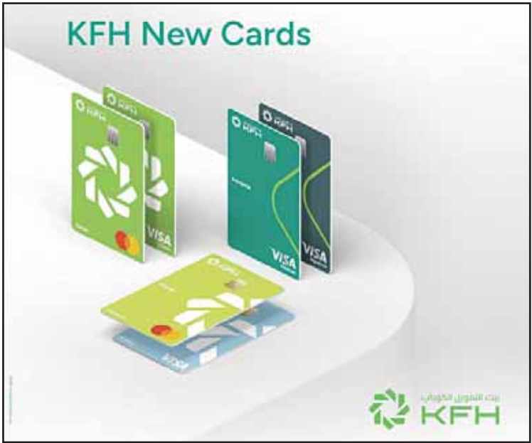
KFH card offers convenience and security with innovative payment experience.

KUWAIT CITY, Dec 28: Kuwait Finance House (KFH) new Virtual Rewards Prepaid Card from, which can be instantly issued 24/7 through KFHOnline app to all customers, has garnered positive customer response and engagement. This is reflected in the high demand to issue the new card and benefit from its various features. The card also offers faster and a more flexible digital banking experience, enabling customers to manage their online purchases with ease. Customers can issue the card through the mobile app and add it directly to their digital wallets. Accordingly, they will have control and security for both local and international online and point-of-sale shopping. The card is fully digital, consisting of 16 digits similar to regular cards, along with a CVV security code and an expiration date. The recently launched product accommodates customers' evolving needs and lifestyle, offering them a distinguished and seamless payment experience that is both easy and secure. In addition to the flexible payment options customized according to customers' needs, whether for online shopping, bill payments, or in-store purchases, the card has broader environmental and social impacts. These include reducing plastic waste and eliminating paper usage. It also contributes to lower carbon emissions by reducing in-person card delivery.