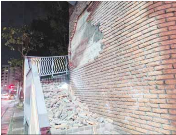
Exterior tiles on a pedestrian bridge are damaged after an earthquake in New Taipei City, southeast China’s Taiwan, Dec. 27, 2025.

MOSCOW, Dec 28, (Agencies): Taiwan is an integral part of China, and Russia opposes Taiwan’s independence in any form, Russian Foreign Minister Sergei Lavrov said on Sunday. In an interview with TASS, Lavrov said that Russia’s principled position on the Taiwan question is well known and unchanged. “Russia recognizes Taiwan as an integral part of China and stands against the island’s independence in any form.” As the top Russian diplomat noted, Russia consistently regards the Taiwan question as an internal affair of China and recognizes China’s legitimate basis for safeguarding its sovereignty and territorial integrity. Lavrov also said in the interview that Japan’s course toward militarization could negatively affect stability in the region. “Recently, the Japanese leadership has been seeking to accelerate the country’s militarization. The detrimental influence of such an approach on the regional stability is obvious,” he said. Also: TAIPEI: The U.S. Geological Survey says a magnitude 6.6 earthquake hit Taiwan just off its northeast coast late Saturday. The earthquake took place at 11:05 p.m. local time, 32 kilometers