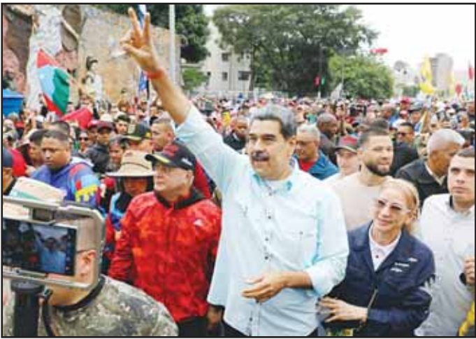
President Nicolas Maduro joins a rally marking the anniversary of the Battle of Santa Ines, which took place during Venezuela's 19th-century Federal War, in Caracas, Venezuela, Dec. 10, 2025.

CARACAS, Dec 28, (Agencies): Venezuelan President Nicolas Maduro has expressed willingness to hold dialogue with the United States on the basis of mutual respect, provided that the United States gives up interference in Venezuela. In a televised speech, Maduro said that if the U.S. side is willing to engage in dialogue with Venezuela on the basis of mutual respect and abandon its failed attempts to interfere in Venezuela over the past 25 years, he will welcome it and seek a path toward peace, cooperation and prosperity. The president also criticized the United States for its sustained smear campaigns against the Venezuelan government, its destabilizing efforts in Venezuela, and its attempts to overthrow the leadership. He called on the U.S. media to report the real situation of Venezuela after truly understanding the country. For months, the United States has deployed large-scale air and naval forces in Caribbean waters near Venezuela under the guise of combating so-called “narco-terrorism.” It has sunk about 30 so-called “drug trafficking ships” in the Ca-