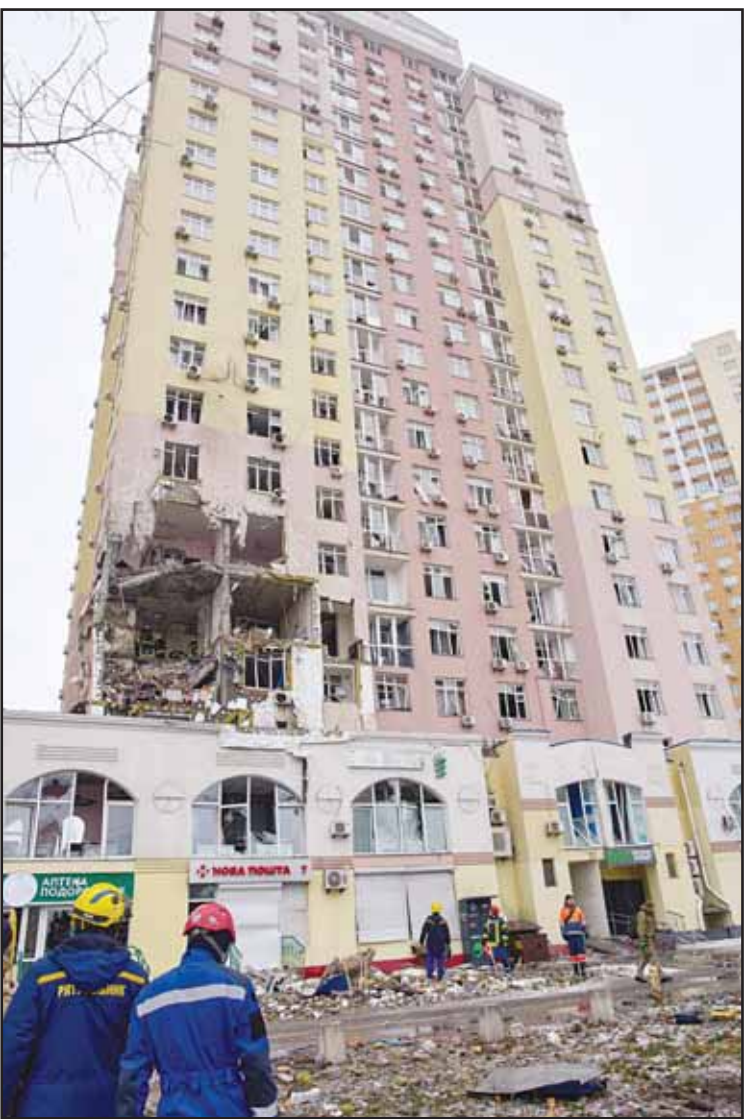
Rescuers work on the scene of a multi-storey apartment building damaged during a Russian massive missile and drone attack in Kyiv, Ukraine, Saturday, Dec. 27, 2025.