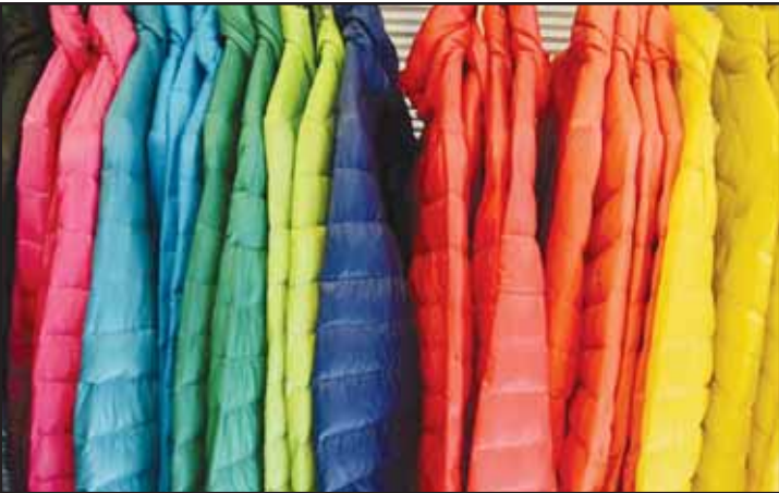
Modern winter jackets use a few time-honored physics principles to keep you warm.

Conduction is the direct flow of heat from your warm body into your colder surroundings. In winter, all that heat escaping your body makes you feel cold. Insulation fights conduction by trapping air in a web of tiny pockets, slowing the heat’s escape. It keeps the air still and lengthens the path heat must take to get out. High-loft down makes up the expansive, fluffy clusters of feathers that create the volume inside a puffer jacket. Combined with modern synthetic fibers, the down immobilizes warm air and slows its escape. New types of fabrics infused with highly porous, ultralight materials called aerogels pack even more insulation into surprisingly slim layers. A good winter jacket also needs to withstand wind, which can strip away the thin boundary layer of warm air that naturally forms around you. A jacket with a good outer shell blocks the wind’s pumping action with tightly woven