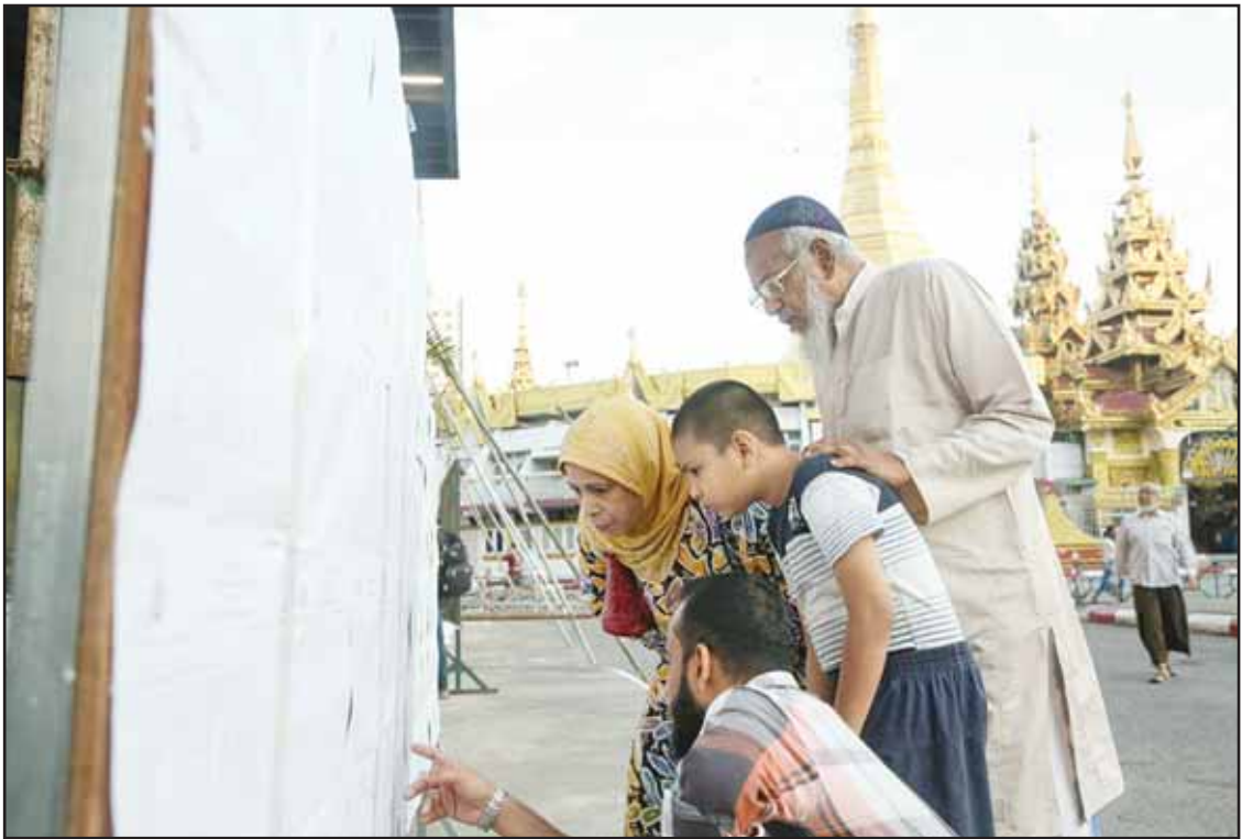
Voters check information at a polling station in Yangon, Myanmar, Dec. 28, 2025.