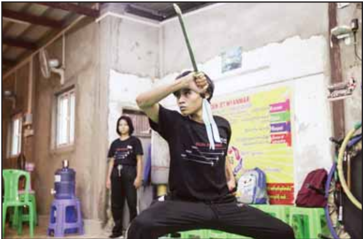
A student practices Chinese martial arts at Golden Jet Myanmar, a Chinese martial arts center in Yangon, Myanmar.