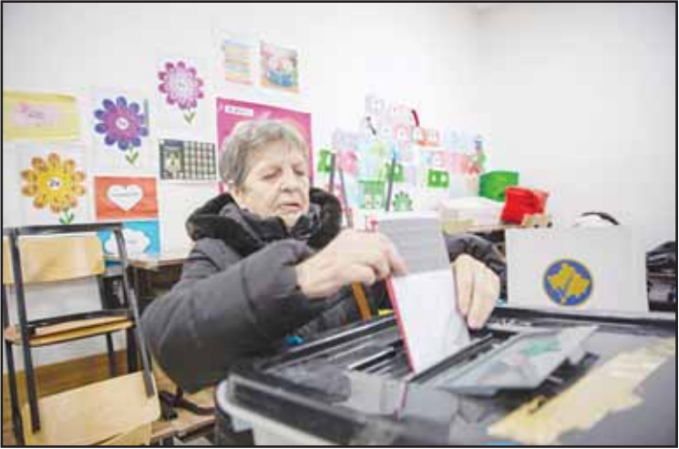
A woman casts her vote in early parliamentary election in Kosovo's capital Pristina, Sunday, Dec. 28, 2025.