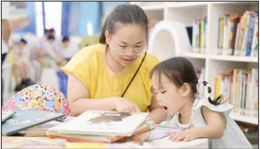
A mother and daughter read at Guangzhou Library in Guangzhou, south China's Guangdong Province.