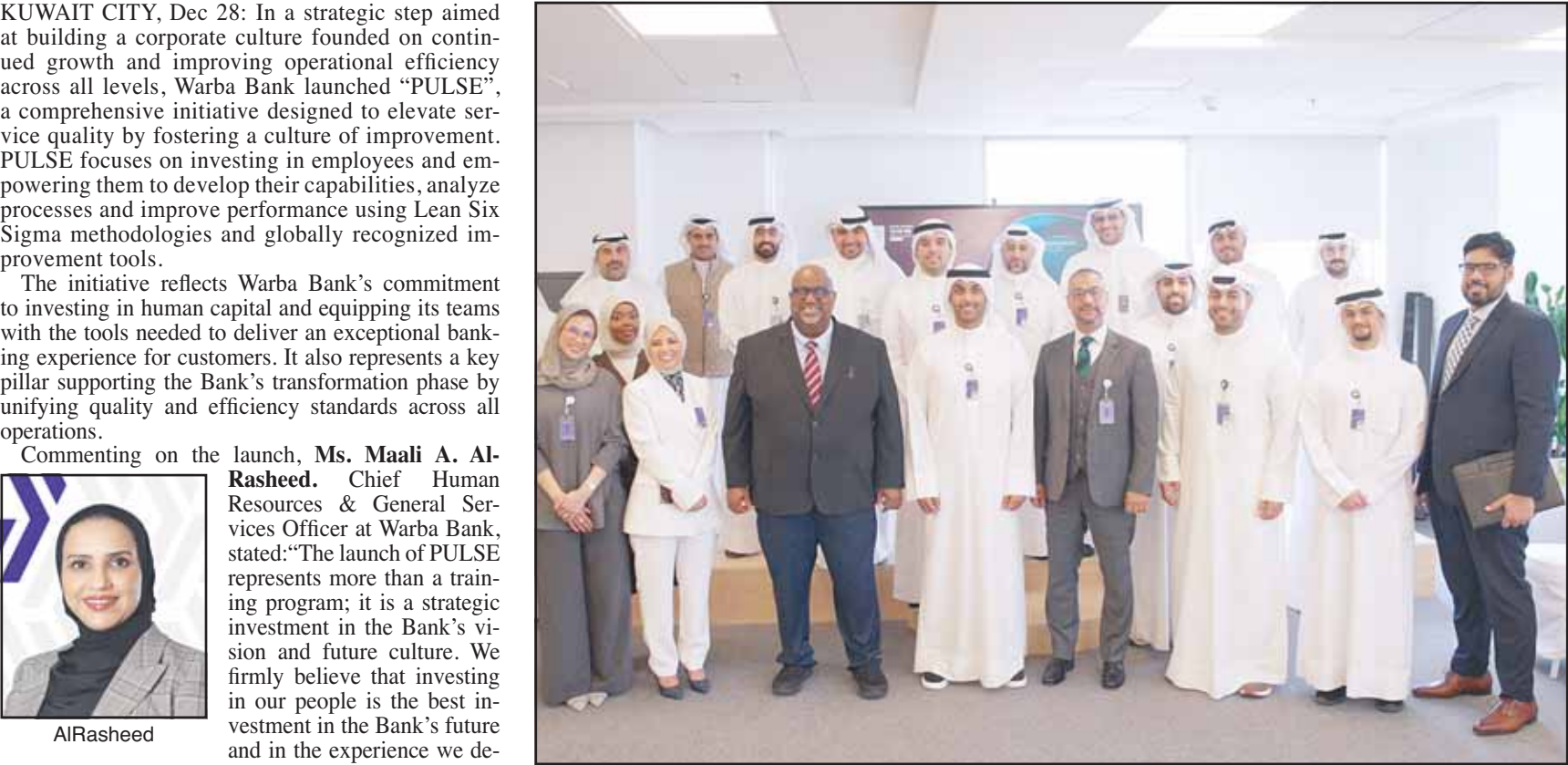
Warba Bank unveils PULSE to build next-generation Lean Six Sigma leaders.

are establishing a unified way of working that makes efficiency and continuous improvement an integral part of our daily identity.” A Comprehensive Program to Build a New Generation of Efficiency Experts PULSE, an acronym for Performance • Uplift • Lean • Strategy • Execution, offers a structured, multi-level development program aimed at building employee capabilities in Lean Six Sigma methodologies. The program delivers intensive hands-on training, advanced problem-solving tools and applied improvement projects, enabling employees to identify process improvement opportunities, analyze root causes, design innovative solutions and measure impact to ensure sustainable improvement. The Bank’s Operational Excellence Department leads the initiative, while the Lean Management Unit is responsible for delivering training and development programs, managing improvement projects, and providing ongoing technical support and guidance to teams. This integrated approach ensures the establishment of strong foundations for a culture of continuous improvement as a core operating principle across all departments of the Bank. Global Methodologies in Service of the Customer PULSE is built on two globally recognized methodologies. The first is Lean, which focuses on increasing customer value by eliminating waste and non-value-