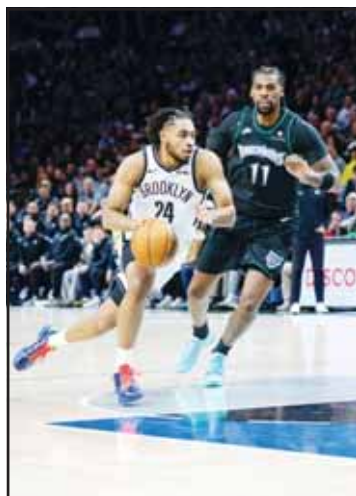
Brooklyn Nets guard Cam Thomas (24) drives to the basket while Minnesota Timberwolves center Naz Reid (11) defends during the second half of an NBA basketball game in Minneapolis.

The game got chippy in the third quarter after New Orleans went on a 12-2 run to cut the deficit to 73-71. Following a whistle, Pelicans guard Jose Alvarado and Phoenix center Mark Williams exchanged punches. Both were ejected.