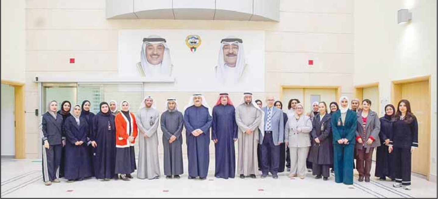
Kuwait Health Minister Dr. Ahmad Al-Awadhi (center) and senior officials pose with staff at the Radiation Protection Department during the launch of the Digital Radiation Licensing Service, part of the ministry's digital transformation initiatives.