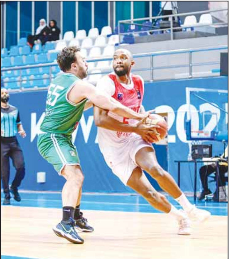
Kuwait Club player in action with the ball.

KUWAIT CITY, Dec 28: Kuwait Club looks to extend its unbeaten run in the basketbakk league when it faces Al-Arabi today at 5:00 PM at Sheikh Saad Al-Abdullah Complex. Kazma will follow at 7:30 PM against Al-Sulaibikhat. The league leader, with 16 points from 8 wins, are heavily favored against Al-Arabi, who sits at the bottom with 8 points from 8 losses. The match may also give the coaching staff a chance to rotate younger players ahead of a key West Asia Super League clash against Saudi Arabia’s Al-Ula next week. In the evening matchup, second-placed Kazma (14 points) meets fifth-placed Al-Sulaibikhat (12 points). Al-Sulaibikhat will aim to keep its playoff hopes alive, while Kazma seeks to maintain its upward momentum. The league features a three-section format, with the top four teams advancing to a best-of-three semifinal playoff.