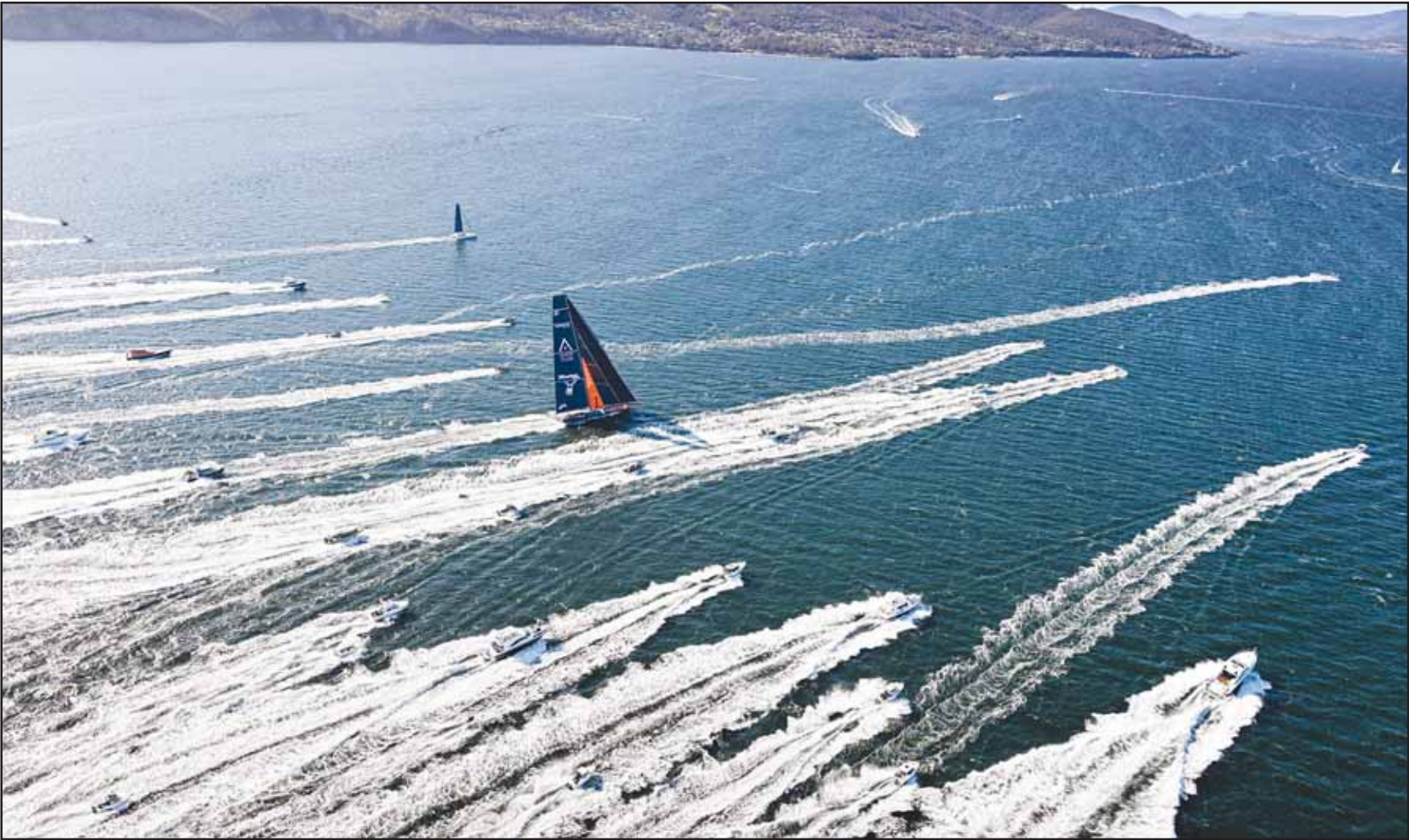
In this photo provided by the Cruising Yacht Club of Australia, Comanche, center, is escorted by spectator craft as it crosses the finish line in Hobart, Australia to claim line honors in the Sydney Hobart yacht race.