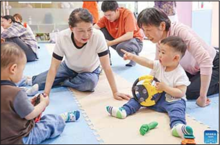
In this file photo dated April 24, 2024, children exchange their toys during an activity at a Community Based Family Support (CBFS) center at the Jinxiu community of Xiling district, Yichang city of Central China’s Hubei province. (Xinhua)