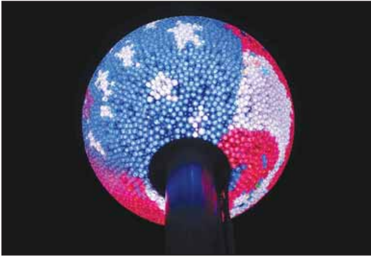
This image provided by America250 in December 2025 shows the New Year's Eve ball designed for the U.S.'s 250th year.