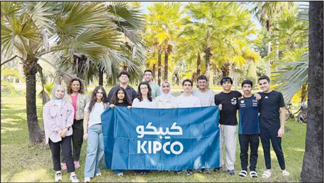
Loyac 'Winter Leadership Retreat' participants with chaperones.

Teens build leadership & teamwork skills