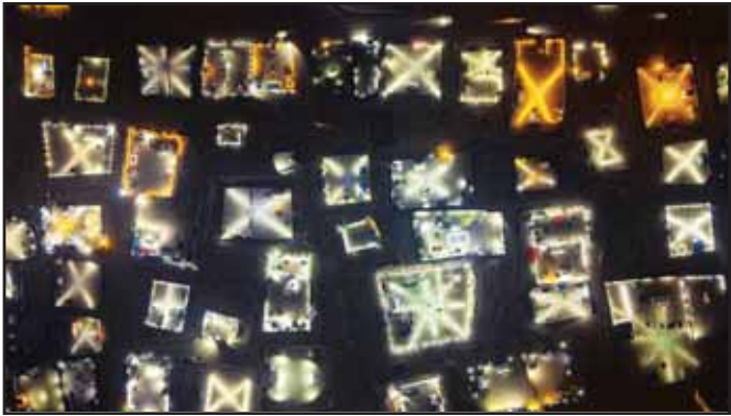
A dazzling aerial view of Kuwait's winter camps at night, where tradition meets modern lighting, creating a vibrant cultural landscape.