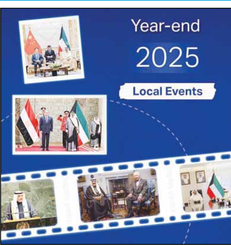
2025 highlights Kuwait's year of milestones.

Tel: +973 17701201 - Ext. 351 | Email: reservation@albander.com | www.albander.com | @albanderhotelandresort