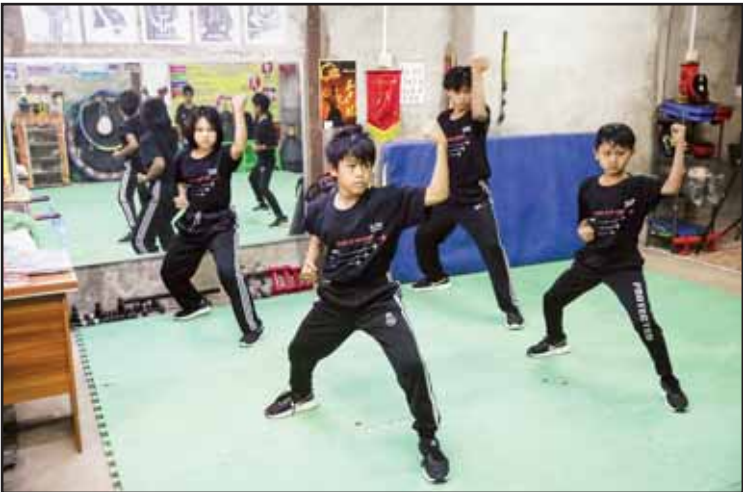
Students practice Chinese martial arts at Golden Jet Myanmar, a Chinese martial arts center in Yangon, Myanmar.