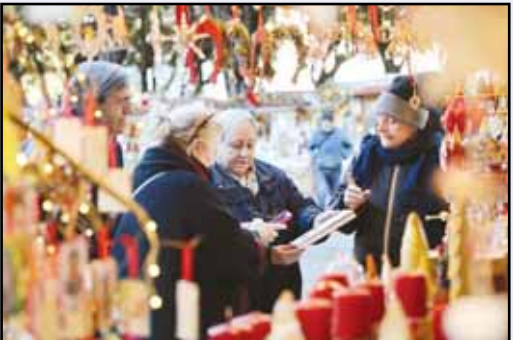
People shop at a Christmas market at Piazza Navona in Rome, Italy, Dec. 27, 2025.