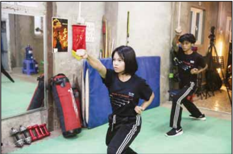
Students practice Chinese martial arts at Golden Jet Myanmar, a Chinese martial arts center in Yangon, Myanmar.