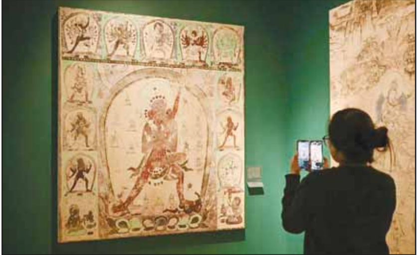
A guest takes photos of a Dunhuang mural during the preview of the Dunhuang Culture and Art Public Benefit Exhibition in east China's Shanghai.