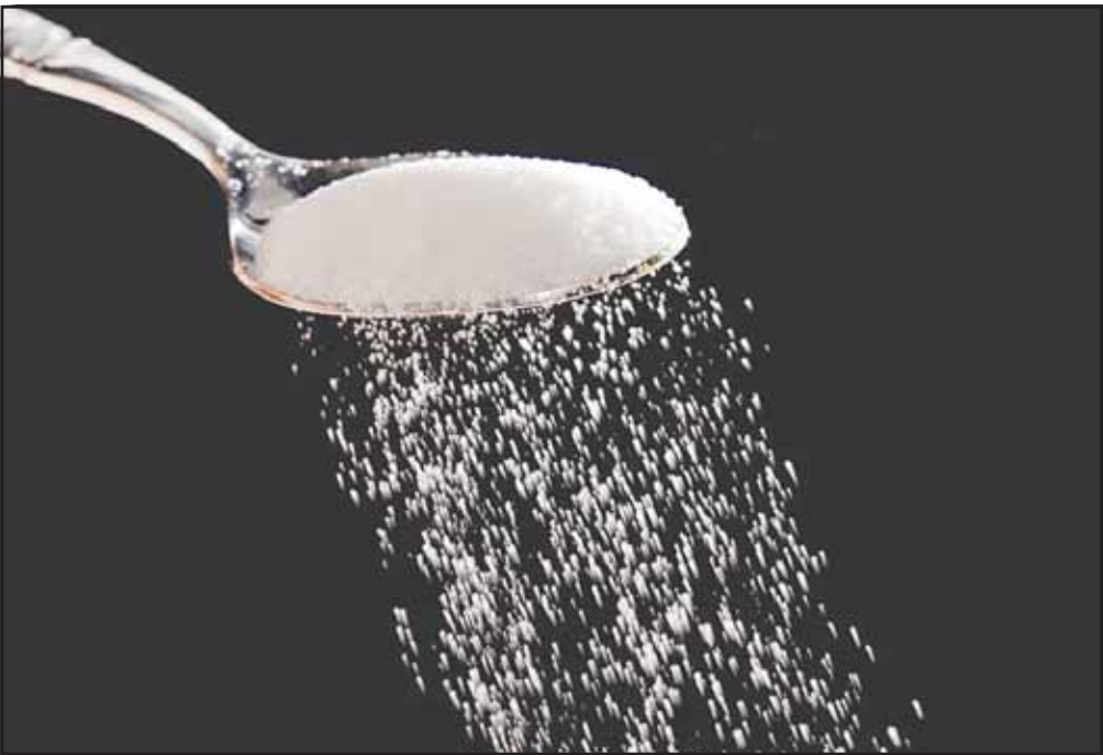
This photo illustration shows granulated sugar falling from a spoon, in Philadelphia, on Sept. 12, 2016.

2,000 calories, or a bit more than what’s in a typical can of soda. But that might be too flexible, Popp said. “I would actually like to see that be less than 5%, and closer to zero for some, if they have diabetes or prediabetes,” he said. The key is to be mindful of what you’re eating, even if the product seems healthy or if the package is labeled organic, Popp said. Roasted nuts, plant-based milks and wasabi peas, for example, can include a surprising amount of added sugars. So can English muffins and Greek yogurt. One Chobani black cherry yogurt, for example, has zero grams of fat but 9 grams of added sugar, or more than 2 teaspoons. Silk brand almond milk has 7 grams per cup. Popp recommends taking control of how much sugar goes into your food. That could mean buying