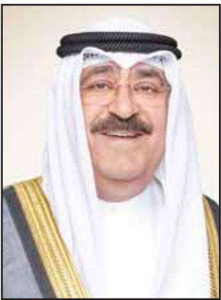
His Highness the Amir

The Ambassador concluded his statement by expressing the Republic of Tajikistan's aspiration to continue coordination and consultation with the State of Kuwait in the New Year, and to further advance bilateral relations toward broader horizons, reinforcing strategic partnership and consolidating bonds of friendship and cooperation between the two friendly countries.