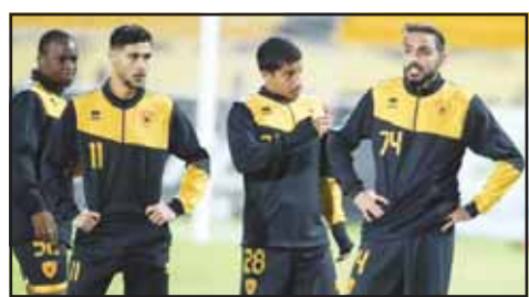
Senegal fans cheer during the Africa Cup of Nations Group D soccer match between Senegal and DR Congo in Tangier, Morocco.