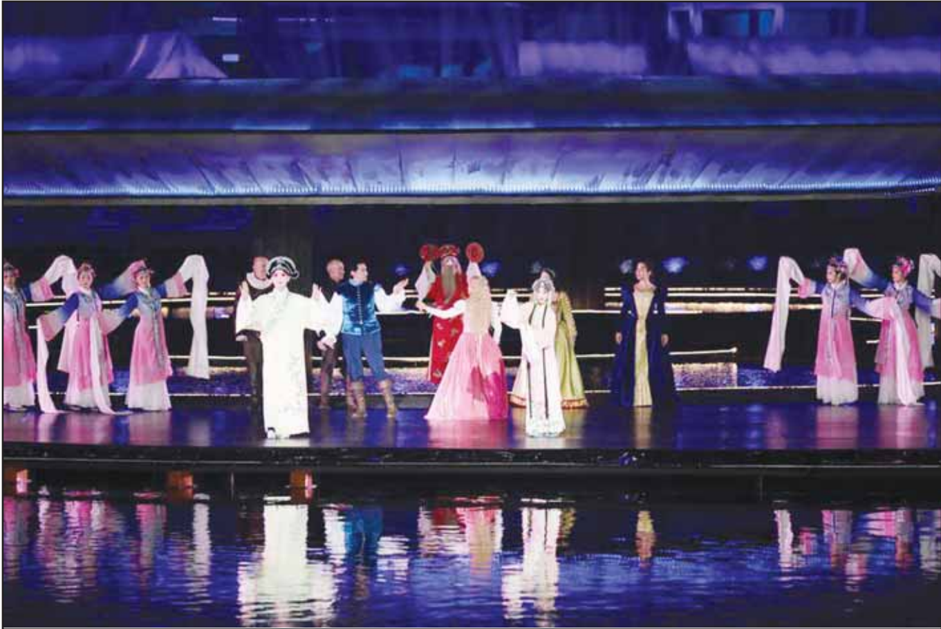
Actors stage a performance at the opening ceremony of the Seventh Tang Xianzu International Theatre Exchange Month in Fuzhou City, east China's Jiangxi Province.