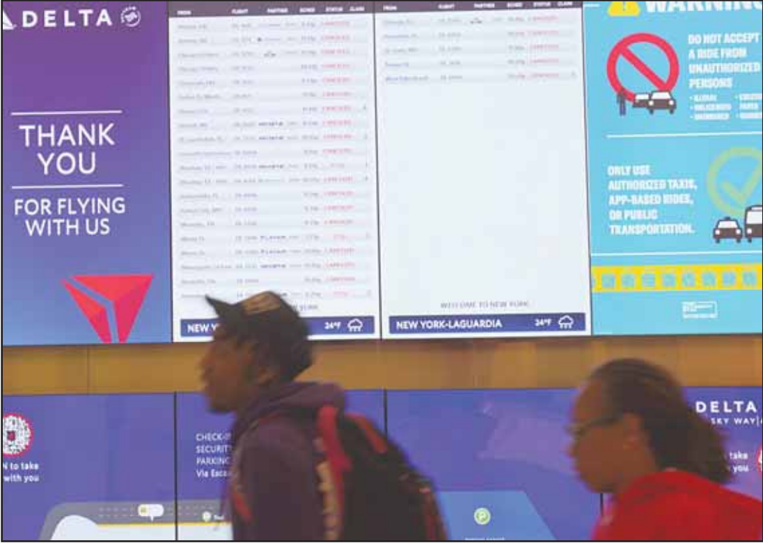
A screen shows many flights cancelled due to a snowstorm at LaGuardia Airport in New York, the United States, on Dec. 26, 2025. A snowstorm hit New York on Friday, which has caused flight delays and cancellations.