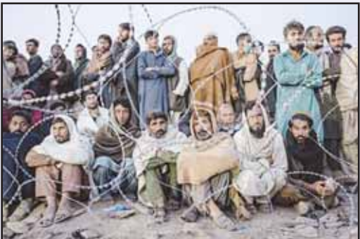
Afghan refugees wait to register in a camp near the Torkham Pakistan-Afghanistan border in Torkham, Afghanistan, Saturday, Nov. 4, 2023.

ARCS distributes cash assistance: The Afghan Red Crescent Society (ARCS) has distributed more than 22 million Afghanis (over 333,000 U.S. dollars) in cash assistance to families who recently returned to eastern Afghanistan’s Ghazni province, local media outlet Tolo news reported on Sunday. According to the report, around 1,300 families who returned from neighboring Pakistan and Iran received financial support in the province. Each family was provided with 17,000 Afghanis to help meet their immediate needs. Beneficiaries welcomed the assistance as the aid will help them cope with the challenges of resettlement. As thousands of Afghan families continue to return from neighboring countries, many face urgent needs for basic services and livelihoods. In response, the ARCS has launched several humanitarian initiatives in various provinces to support returnees during this critical period. (Xinhua)