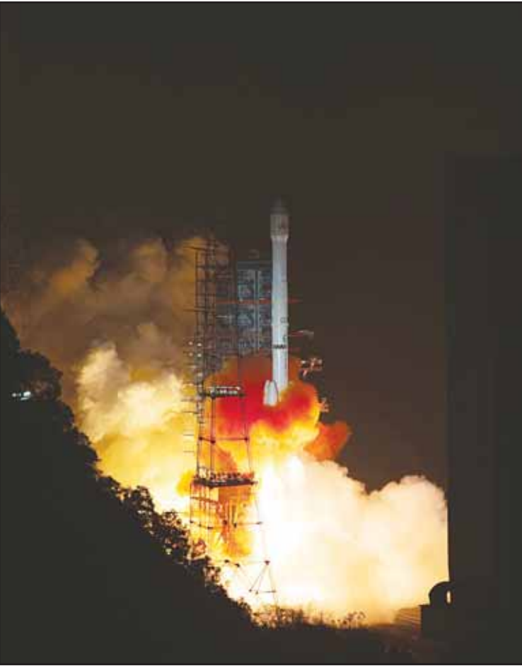
A Long March-3B rocket carrying the Fengyun-4 03 Satellite blasts off from the Xichang Satellite Launch Center in southwest China’s Sichuan Province, Dec. 27, 2025. The Satellite has entered its planned orbit.

XICHANG, Dec. 28, China on Saturday sent a new satellite into space from the Xichang Satellite Launch Center in the country’s southwestern Sichuan Province. The satellite, Fengyun-4 03, was launched by a Long March-3B rocket at 12:07 a.m. (Beijing Time) and has entered its planned orbit. With this successful launch, China’s Fengyun meteorological satellite family -- now consisting of more than 20 satellites -- has gained a new member that is considered the most capable in terms of comprehensive observation capabilities. According to the Shanghai Academy of Spaceflight Technology (SAST), the Fengyun-4 03 satellite is equipped with four Earth-observation instruments and two solar-observation instruments. It features a range of advanced capabilities, representing a substantial upgrade in observational performance, detection parameters and data transmission efficiency. Among its instruments, the advanced geostationary radiation imager can now complete a full-disk scan of Earth in five minutes -- three times faster than the previous 15-minute cycle -- and is sensitive enough to detect atmospheric temperature variations as small as one-fiftieth of a degree Celsius from