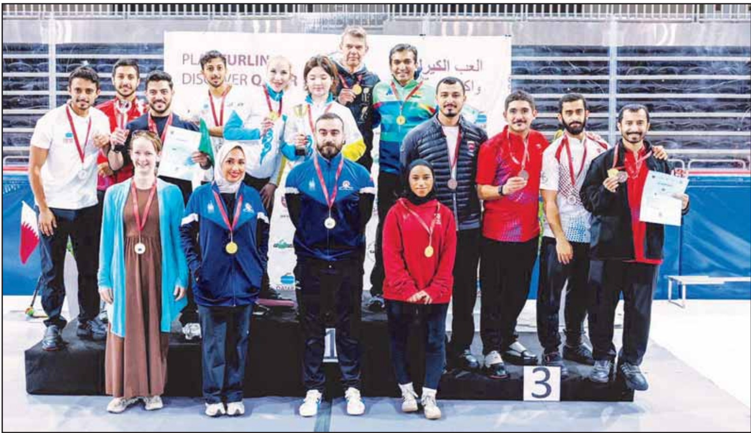
Winners celebrate on the podium after the awarding ceremony.

DOHA, Dec 28: The Kuwait national curling team put in a strong showing at the Qatar International Open Championship, which concluded recently at the Ali bin Hamad Al-Attiyah Ice Arena in the Al Sadd district, finishing the tournament in third place.