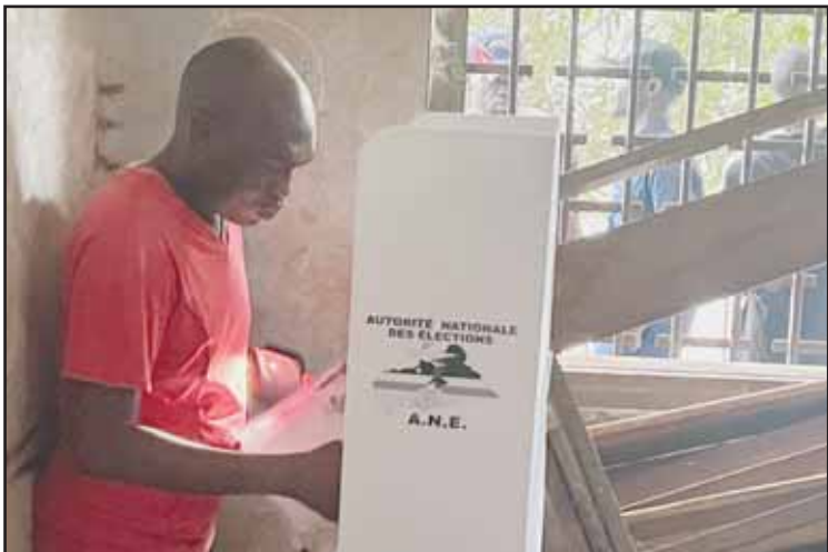
Left: A man casts his ballot during the presidential election in Bangui, Central African Republic, Sunday, Dec. 28, 2025. Right: Voters look for their names on a registration list at a polling station during the presidential election in Bangui, Central African Republic, Sunday. (AP)

BANGUI, Central African Republic, Dec 28, (AP): Voters in the Central African Republic (CAR) are electing a new president and federal lawmakers Sunday, with incumbent President Faustin Archange Touadéra seen as likely to win a third term after trying to stabilize the country with the help of Russian mercenaries. Touadéra is one of Russia’s closest allies in Africa and analysts say a third term win for him would likely consolidate Russia’s security and economic interests in the country even as Moscow faces growing scrutiny over its mercenaries’ roles in Africa. The Central African Republic was among the first in Africa to welcome Russia-backed forces, with Moscow seeking to help protect authorities and fight armed groups. Tensions, though, have grown this year over Moscow’s demand to replace the private Wagner mercenary group with the Russian military unit Africa Corps. Some 2.4 million voters are registered to vote in Sunday’s national elections, which is unprecedented in scope as it combines the presidential, legislative, regional and municipal ballots. There were initial delays with voting starting an hour late in some polling stations mostly in outlying districts of the capital, Bangui. Some voters also said they couldn’t find their names on the electoral rolls, or where they are to vote. “When we arrived, no one was