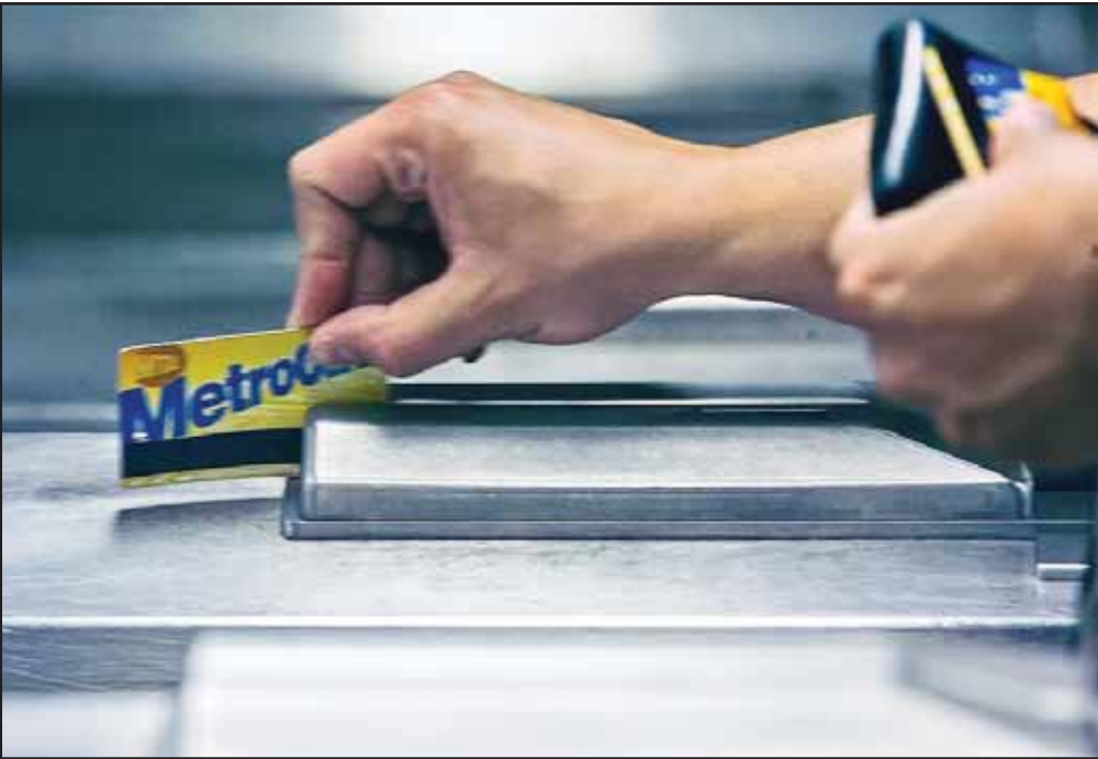
A subway rider swipes his MetroCard in a turnstile as he enters the 34th St. subway station, July 23, 2007, in New York.

Artists from David Bowie and Olivia Rodrigo to seminal New York hip hop acts, such as the Wu-Tang Clan, the Notorious B.I.G. and LL Cool J, have also graced the plastic card over the years, as have iconic New York shows like Seinfeld and Law & Order.