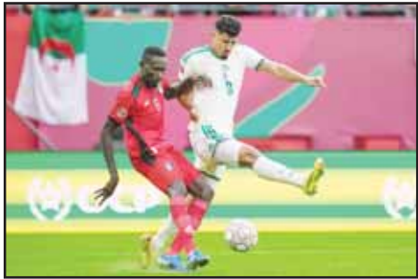
Sudan’s Mustafa Karshom, left, challenges for the ball with Algeria’s Baghdad Bounedjah during the Africa Cup of Nations Group E soccer match between Algeria and Sudan in Rabat, Morocco.

the world’s worst humanitarian crisis. It erupted in April 2023 when a power struggle between the military and the powerful paramilitary Rapid Support Forces exploded into open fighting, with widespread mass killings and rapes, and ethnically motivated violence. The conflict has killed more than 40,000 people according to U.N. figures, but aid groups say the true number could be many times higher. More