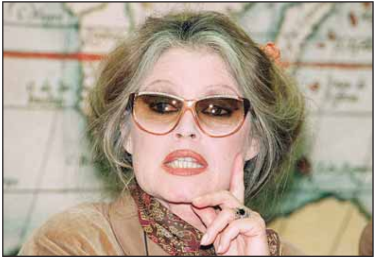
In this file photo, former French film star Brigitte Bardot attends a press conference in Brussels protesting against cruelty against animals in Europe, especially the cruelties practiced during festivities in Spain.

She attacked centuries-old French and Italian sporting traditions including the Palio, a free-for-all horse race, and campaigned on behalf of wolves, rabbits, kittens and turtle doves.