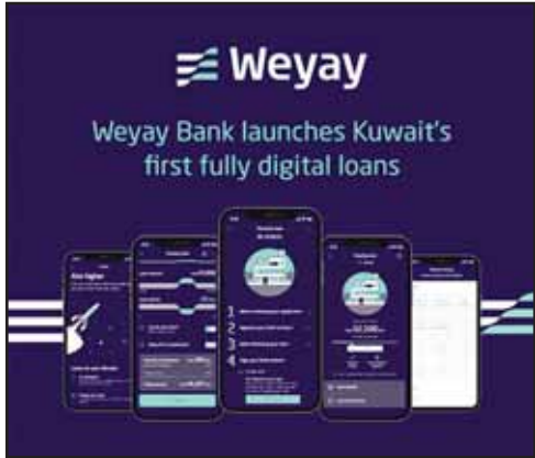
Weyay - Kuwait's first fully digital loans

of operating. Through our new strategy, we stop viewing data as static numbers in rigid tables and instead treat it as the voice of the customer, one we listen to clearly and respond to effectively. Imagine a bank that does not merely process your daily transactions, but anticipates your future needs and responds to them before you even ask." He noted that through advanced analytics and artificial intelligence, which has become a core pillar of the Group's strategy, NBK is able to deliver more tailored products, deeper financial insights for customers, and more prudent risk management.