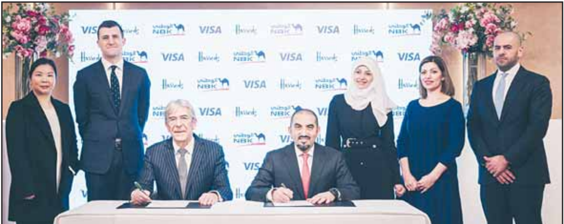
Signing an exclusive partnership agreement with Harrods.