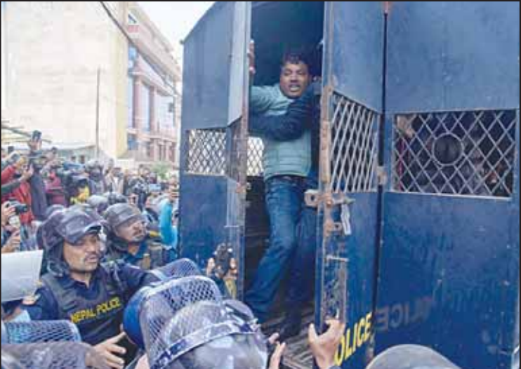
Photos show Nepalese police detain protesters during an anti-government rally in Kathmandu, Nepal, Monday, Dec. 22, 2025.