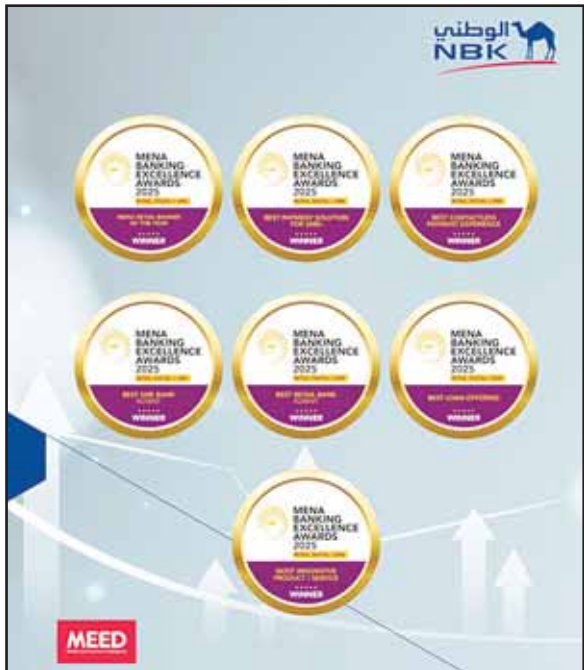
National Bank of Kuwait wins 7 awards from MEED magazine.