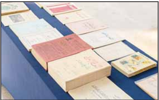
Some of the rare books in the exhibition.