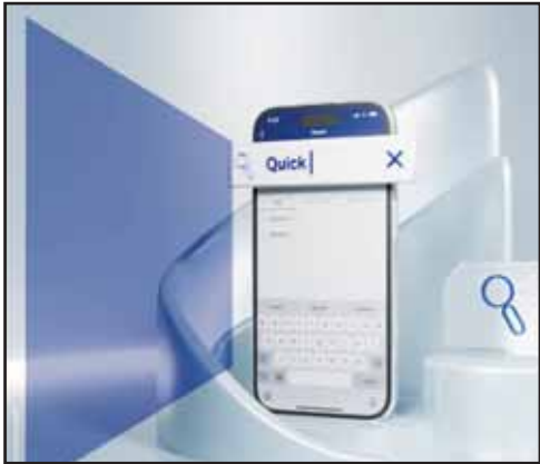
NBK mobile online banking.