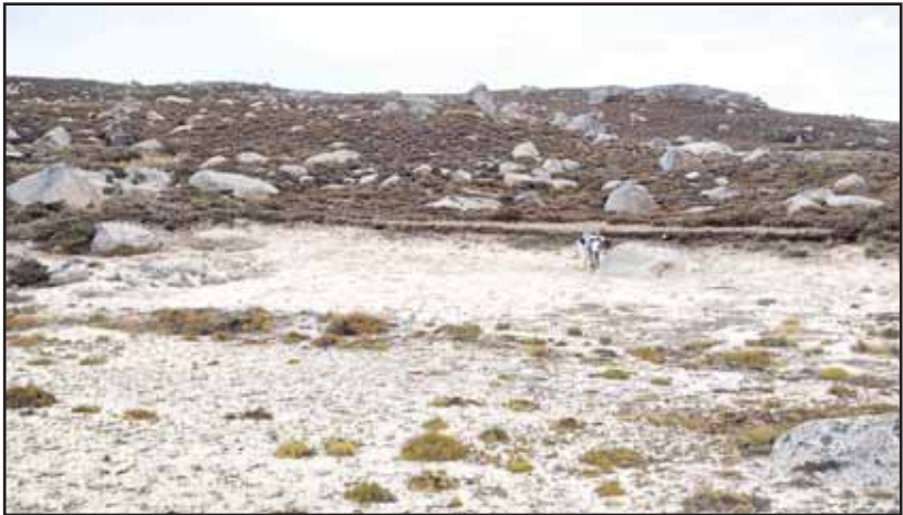
This photo taken on Oct. 6, 2023 shows a view of the Tsungqen Co site in Daocheng County, Garze Tibetan Autonomous Prefecture, southwest China's Sichuan Province.

Excavations and multidisciplinary research at the Piluo site are currently underway. Scientists are conducting comprehensive analyses in chronology, environmental archaeology, and related fields on the unearthed remains, aiming to reconstruct a more precise and nuanced understanding of ancient lifeways in this region.