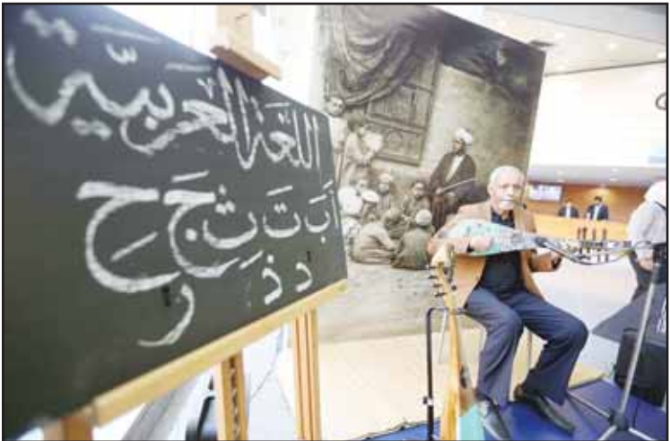
A musician performs during an event marking World Arabic Language Day at the National Museum of Egyptian Civilization in Cairo, Egypt.