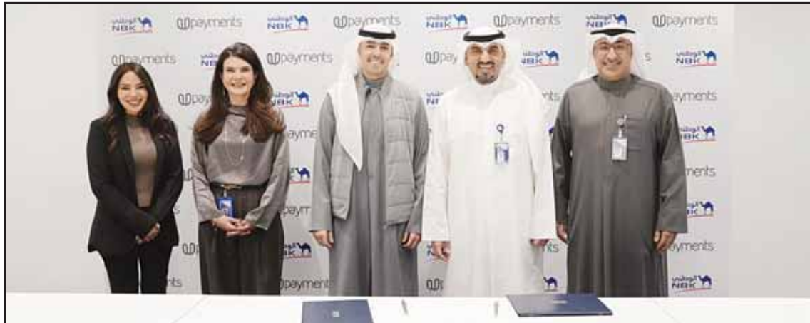
Signing ceremony for the acquisition agreement with Upayments.