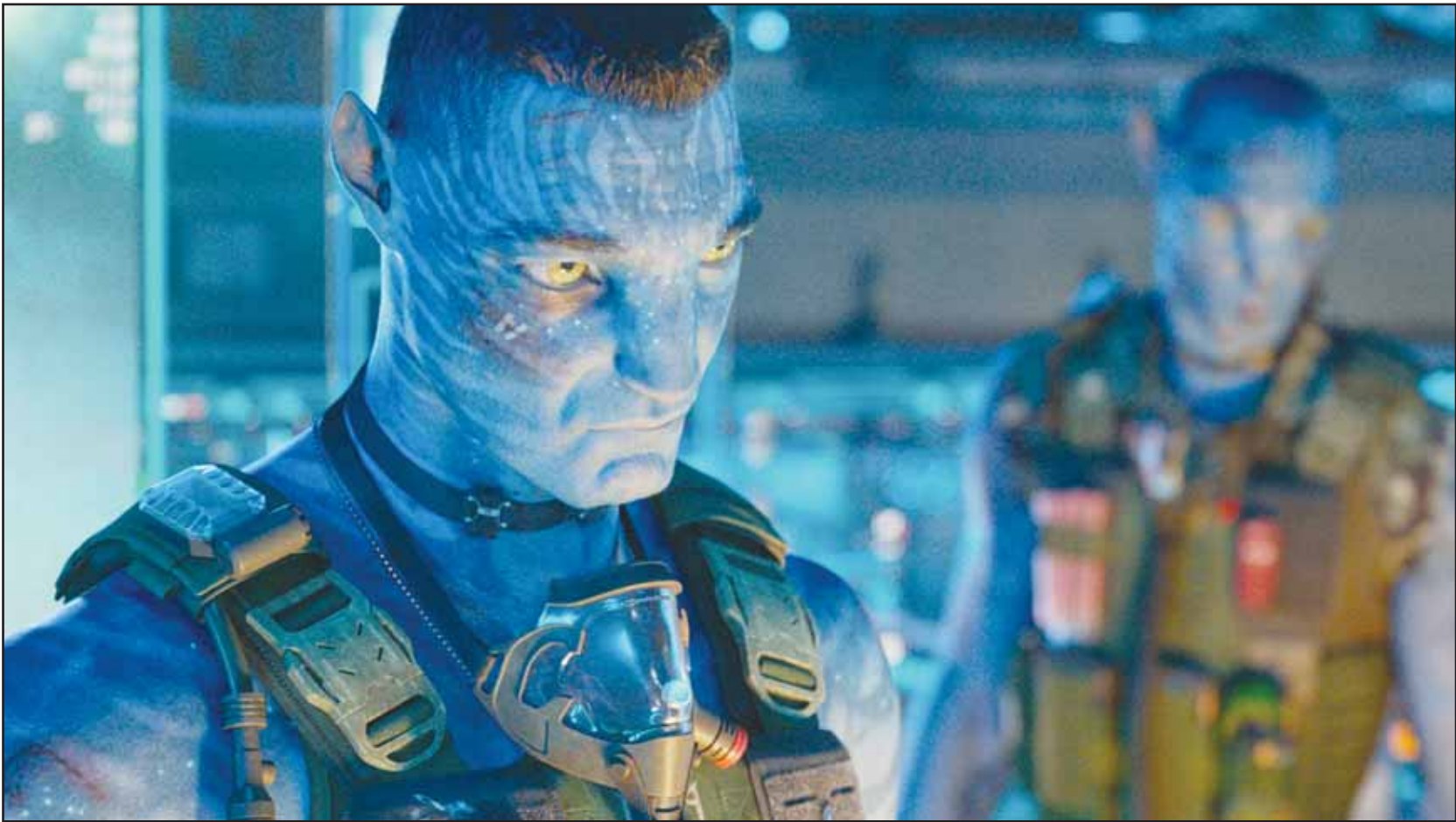
This image released by 20th Century Studios shows Quaritch, performed by Stephen Lang, in a scene from ‘Avatar: Fire and Ash.’

Film launches with $88m domestically, $345m worldwide