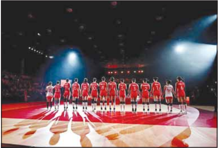
In this file photo, players of China line up for the national anthem before the Preliminary Phase Pool F match against the Dominican Republic at the Volleyball Women's World Championship in Chiang Mai, Thailand.