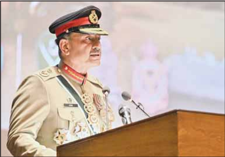
In this photo released by the Inter Services Public Relations, Pakistan’s Chief of Defense Forces and Army Chief Gen. Asim Munir speaks during a ceremony at the joint military command headquarters in Rawalpindi, Pakistan, Monday, Dec. 8, 2025.

ISLAMABAD, Dec 22, Saudi Arabia has awarded its highest national honor to Pakistan’s army chief, Field Marshal Asim Munir, during his visit to Riyadh, Pakistan’s military said Monday, underscoring deepening ties between the two countries, including cooperation on counterterrorism. Munir received the King Abdulaziz Medal of the Excellent Class on Sunday, months after Saudi Crown Prince Mohammed bin Salman signed a defense pact with Pakistani Prime Minister Shehbaz Sharif highlighting the longstanding strategic relationship between the two countries. In September, Defense Minister Khawaja Mohammad Asif said his nation’s nuclear program “will be made available” to Saudi Arabia if needed under the countries’ new defense pact. Munir’s visit to Saudi Arabia and other Islamic countries is his first since his promotion to Pakistan’s newly created post of chief of defense forces, aimed at improving coordination among the army, navy, and air force. Saudi Arabia has maintained close economic, religious, and security ties with Pakistan for decades. Munir rose to prominence earlier