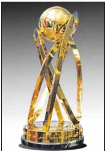
Amir Cup trophy.

Kuwait Club began its cup campaign with a 3-0 win over Al-Ja-