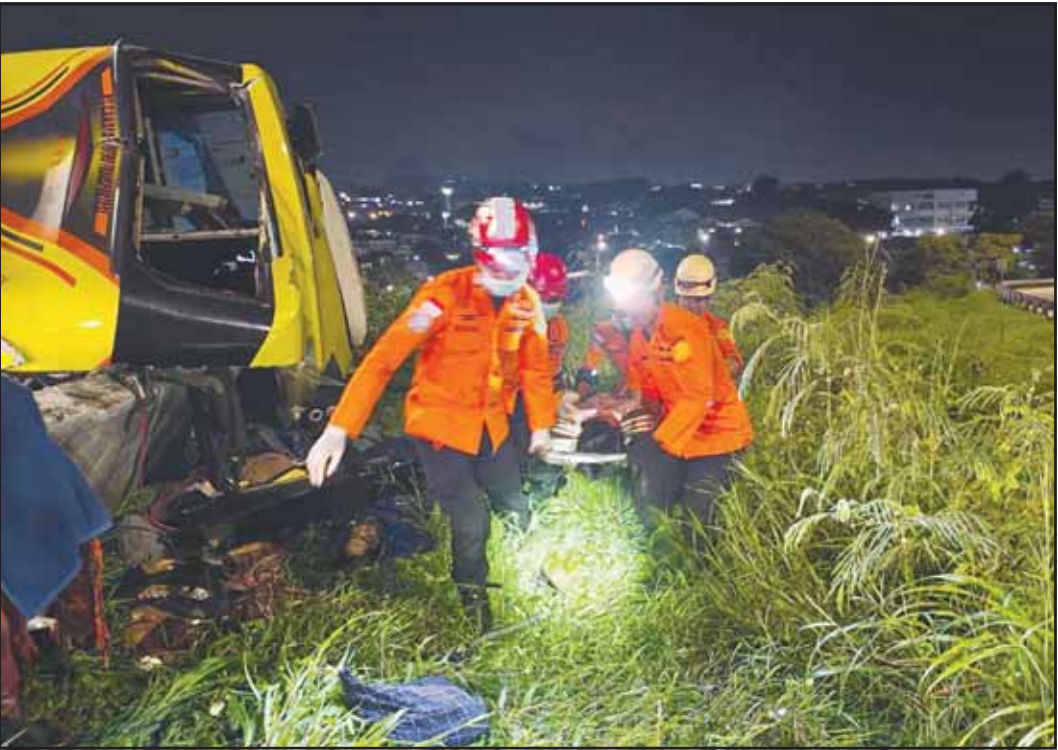
In this photo released by the Semarang Search and Rescue Office, rescuers carry a survivor of a deadly bus crash on a stretcher, in Semarang, Central Java, Indonesia, Monday, Dec. 22, 2025. (AP)

JAKARTA, Dec 22, (AP): A passenger bus crash killed at least 16 people on Indonesia’s main island of Java just after midnight Monday, officials said. The bus carrying 34 people lost control on a toll road and struck a concrete barrier before rolling onto its side, said Budiono, a search and rescue agency chief who goes by single name like many Indonesians. The inter-province bus was traveling from the capital Jakarta to the country’s ancient royal city of Yogyakarta when it overturned while entering a curved exit ramp at the Krapyak toll way in Central Java’s Semarang city, he said. “The forceful impact threw several passengers and left them trapped against the bus body,” Budiono said. Police and rescue teams arrived about 40 minutes after the accident and recovered the bodies of six passengers who died at the scene. Another 10 people died on the way to a hospital or while being