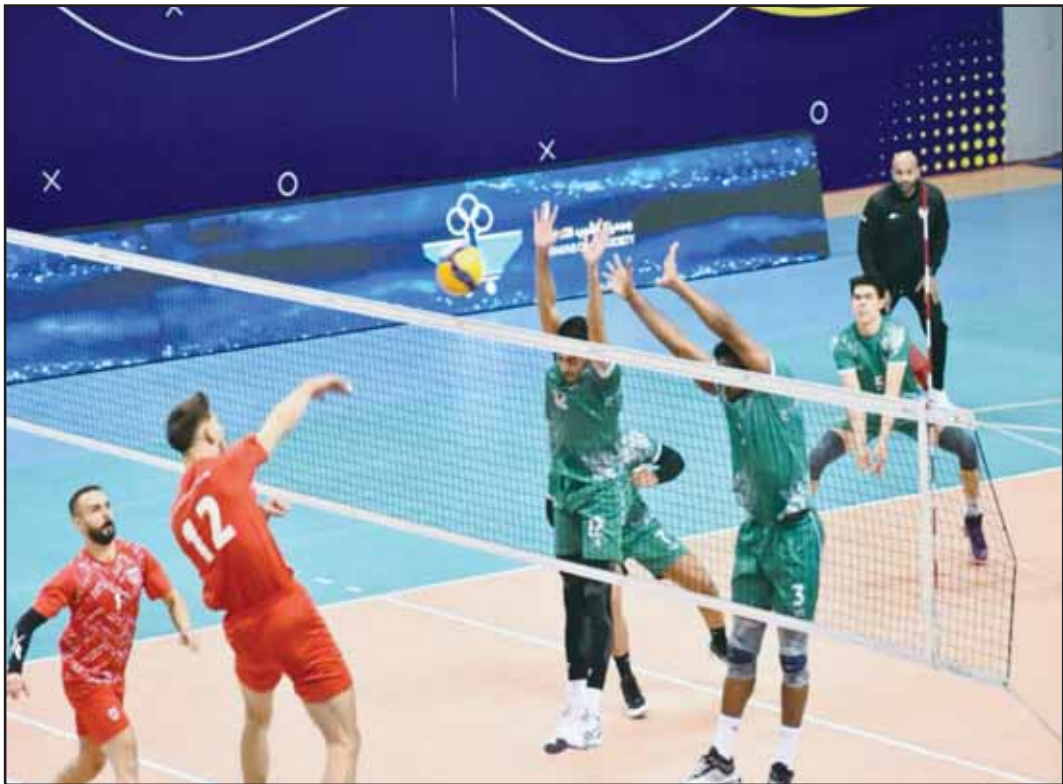
Al-Sulaibikhat player spikes as Al-Arabi player rushes to defend.

KUWAIT CITY, Dec 22: Al-Sulaibikhat claimed a hard-fought 3-2 victory over Al-Arabi in the third round of the volleyball league, while Al-Qadsia secured a 3-1 win against Burgan. The win took Al-Sulaibikhat to 8 points, sharing the top spot with Kuwait Club. Al-Arabi sits in third with 7 points, alongside Al-Qadsia, while Burgan remains at the bottom with just one point. In the first match, Al-Arabi looked poised for a third consecutive win, taking the first two sets 28-26 and 25-22. However, Al-Sulaibikhat bounced back, winning the next two sets 25-21 and 25-23 to force a decisive fifth set, which they clinched 15-11 for a crucial victory at the top of the table. In the second match, Al-Qadsia dominated the opening set 25-16, before Burgan fought back to take the second 26-24. The yellow-clad side returned strongly to secure the final two sets 25-16 and 25-21, earning all three points and marking their second win of the tournament. The league format sees teams