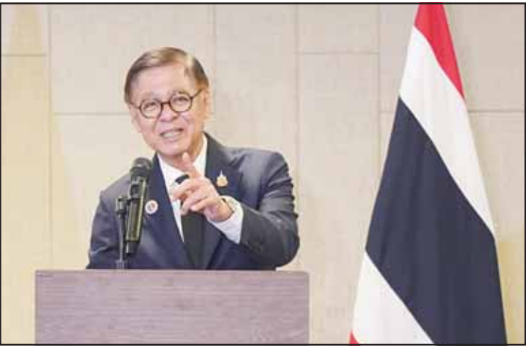
Thailand’s Foreign Minister Sihasak Phuanketkeow speaks during a news conference in Kuala Lumpur, Malaysia, Monday, Dec. 22, 2025, after a special meeting of ASEAN foreign ministers to discuss an ongoing border conflict between Thailand and Cambodia.

The fighting has drawn international concern. The U.S. Department of State on Sunday released a statement calling for Thailand and Cambodia to “end hostilities, withdraw heavy weapons, cease emplacement of landmines, and fully implement the Kuala Lumpur Peace Accords, which include mechanisms to accelerate humanitarian demining and address border issues.” The fighting is a result of a dispute over patches of territory claimed by both nations along their shared border. Southeast Asian foreign ministers gathered Monday in the Malaysian capital Kuala Lumpur for a special meeting to discuss an ongoing border conflict between Thailand and Cambodia that escalated into deadly combat two weeks ago. The meeting marked the second time this year that the regional Association of Southeast Asian Nations, or ASEAN, served as a platform to promote de-escalation between its two member states. The new fighting derailed a ceasefire promoted by U.S. President Donald Trump, which ended five days of combat in July. The agreement was brokered by Malaysia and pushed through under pressure from Trump, who threatened to withhold trade privileges unless Thailand and Cambodia agreed. The