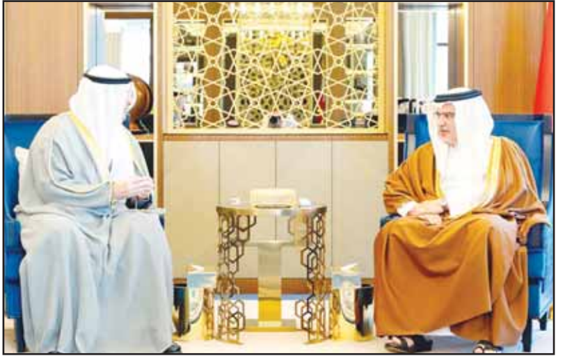
Left: Bahrain's King Hamad bin Isa Al-Khalifa receives Kuwait's Minister of Information and Culture and Minister of State for Youth Affairs, Abdulrahman Al-Mutairi. Right: Bahrain's Crown Prince and Prime Minister Prince Salman bin Hamad Al-Khalifa with Kuwait's Minister of Information and Culture and Minister of State for Youth Affairs Abdulrahman Al-Mutairi.