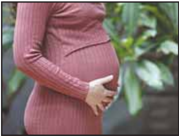
The researchers at Flinders University discovered the circular RNAs bind to DNA, triggering ageing and limiting the placenta’s ability to support the baby.

This premature ageing reduces the placenta’s capacity to support the growing baby, raising the risk of stillbirth, according to the study published