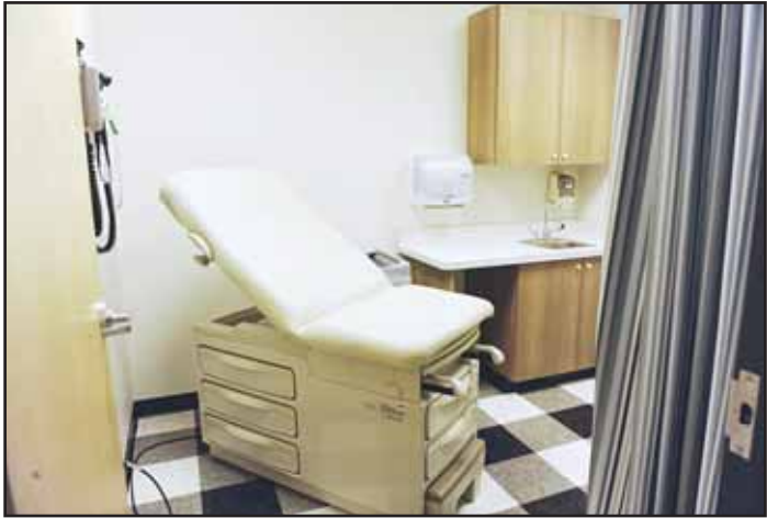
An exam room at a medical clinic in Detroit on July 29, 2015.

Young adults navigating health care on their own for the first time may need help filling out forms with