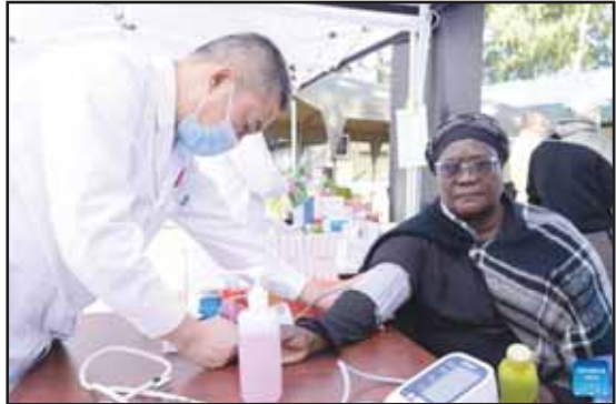
A member of the 25th Chinese medical team in Mozambique provides free medical service to a local resident in Maputo, Mozambique, June 12, 2025.

During the outreach, Chinese medical professionals offered general health check-ups, including vision assess-