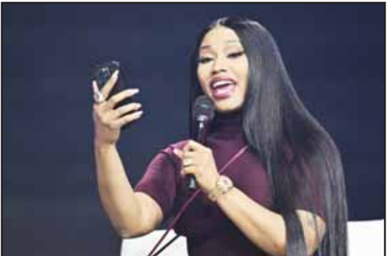
Nicki Minaj speaks during Turning Point USA's AmericaFest in Phoenix.

Minaj’s appearance included an awkward moment when, in an attempt to praise Vance’s political skills, she described