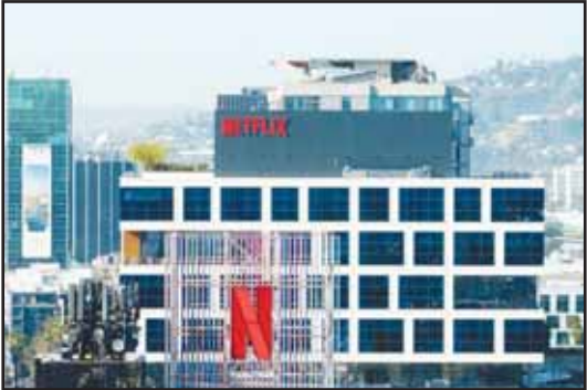
A Netflix sign and the company's logo are displayed atop buildings in Los Angeles.

Some trade groups have warned that the consequences of either deal could include job losses. Layoffs tied to restructuring are common following a merger and wouldn’t likely draw antitrust scrutiny, but Speta notes competition concerns could still arise if a company “becomes so big that it has purchasing power” and is deemed to control wages more broadly.