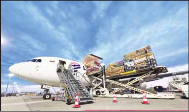
Menzies Aviation expands into Belgium.

Brussels Airport is recognised as a critical European gateway for freighter operations, supporting significant freighter traffic across pharmaceutical, perishables, and high-value logistics corridors. With this new licence, Menzies aims to elevate standards in aircraft turnaround management, streamline ground handling processes,