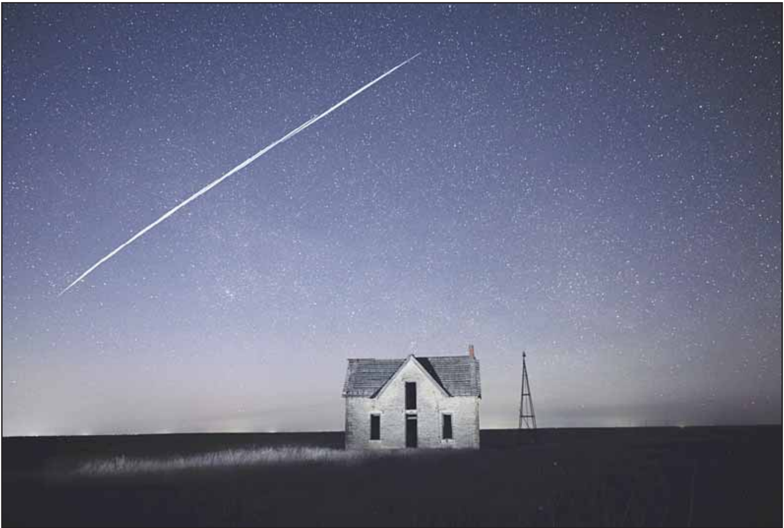
In this long exposure photo, a string of SpaceX StarLink satellites passes over an old stone house near Florence, Kan., on May 6, 2021.

Politico was the first to report on the ambassadorial recalls, which have drawn concern from some lawmakers and the union representing American diplomats.