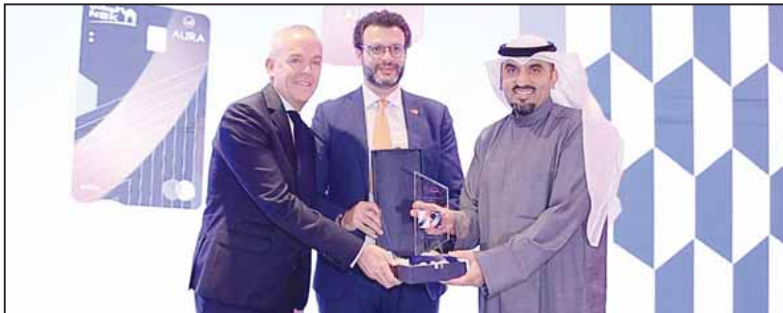
NBK launches NBK – Aura Credit Cards and NBK – Aura Prepaid Cards.