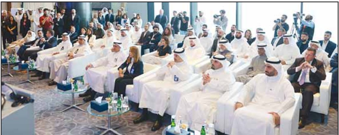
The executive management of the National Bank of Kuwait at the launch ceremony of the 'Al Manzel' program.

Through a wide range of innovative initiatives, products, & cross-continental strategic partnerships in 2025