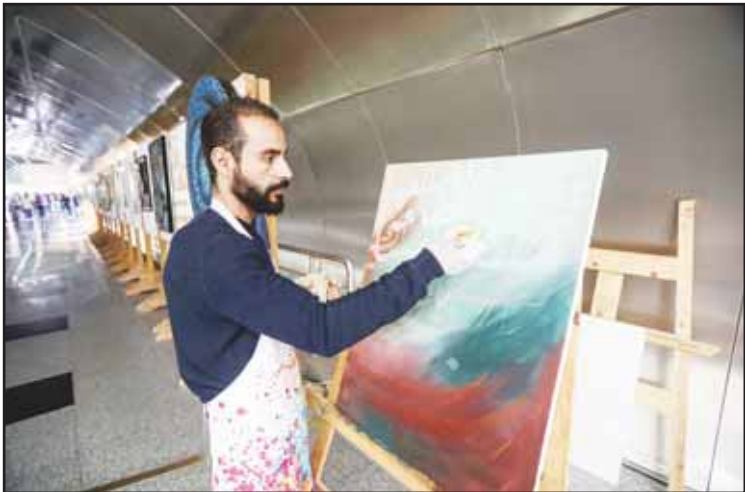
A man demonstrates Arabic calligraphy during an event marking World Arabic Language Day at the National Museum of Egyptian Civilization in Cairo.