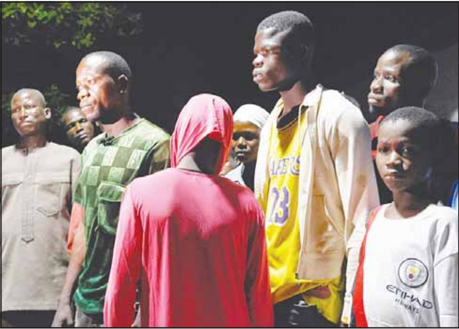
Freed students of St. Mary’s Catholic School are reunited with their parents in Papiri community, Nigeria, Tuesday, Dec. 9, 2025.

said. Sunday Dare, another spokesperson for Nigeria’s President Bola Tinubu also said 130 schoolchildren were released and that none are left in captivity, in a post on X. No group has claimed responsibility for the Nov. 21 abduction, but locals blamed armed gangs that target schools and travelers in kidnappings for ransoms across Nigeria’s conflict-battered north. The Niger state attack was among a spate of recent mass abductions in Nigeria, and happened four days after 25 schoolchildren were seized in similar circumstances in neighboring Kebbi state’s Maga town. A church in southern Kwara state was also attacked around the same time and the 38 worshippers abducted in that attack last month were freed. Bola Tinubu had been under pressure at home and from U.S. President Donald Trump, who has alleged that Christians are being targeted in Nigeria’s security crisis. Nigerian authorities usually do not say much about rescue efforts and arrests in such cases are rare. Analysts believe that’s because ransoms are usually paid. Officials do not admit payment of ransoms.