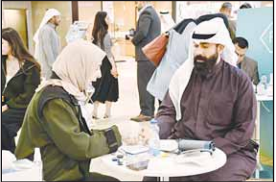
The event, organized by Roche Diagnostics at The Avenues Mall and sponsored by the Kuwait Diabetes Society, promotes early diabetes screening.

Roche Diagnostics affirmed that this event reflects its ongoing commitment to supporting national efforts to enhance health awareness in Kuwaiti society and to contributing to the dissemination of knowledge about the importance of early diagnosis and accurate follow-up for patients with diabetes. The company praised the fruitful cooperation with the Kuwait Diabetes Society, which contributed to the success of the event and the achievement of its awareness and health objectives, within the framework of a partnership aimed at empowering individuals to better manage their health through modern technologies and innovation.