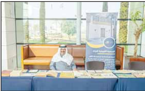
Participation of the Kuwaiti Heritage Society.