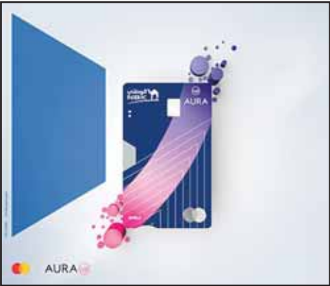
National Bank of Kuwait – Aura card