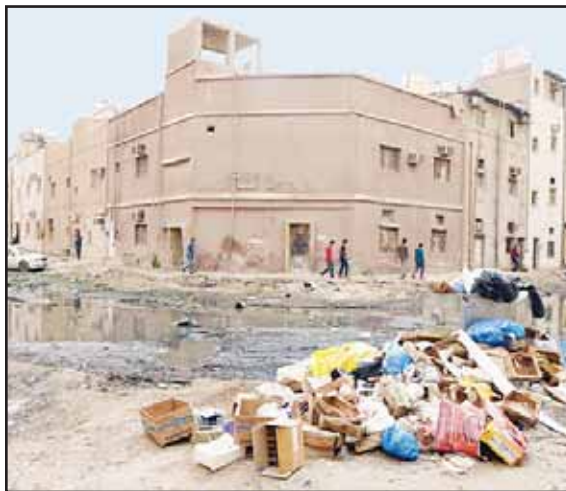
File photo: Sewage water, garbage litter streets in Jleeb Al-Shuyoukh.

Jahra officers, while patrolling Al-Qasr, noticed a vehicle violating traffic regulations. The vehicle was stopped, and they searched the driver and the vehicle. They discovered the pills while searching his vehicle. The suspect was referred with the seized pills to the Drug Control General Department for necessary legal action. The sources affirmed that the suspect will be investigated, and if found guilty of trafficking, he will face the appropriate penalties under the new law.