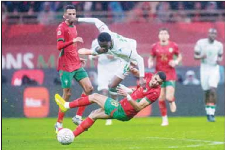
Morocco's Jawad El Yamiqi tackles Comoros' Rafiki Saïd Ahamada during the Africa Cup of Nations Group A soccer match between Morocco and Comoros in Rabat, Morocco.

Morocco is the highest-ranked African team at No. 11. The Atlas Lions, as the team is known, became the first from