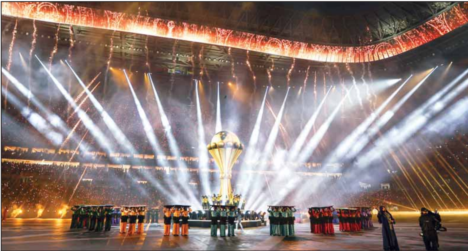
Performers take part in the opening ceremony of the Africa Cup of Nations and the opening Group A soccer match between Morocco and Comoros in Rabat, Morocco.

'This will be the best ever Africa Cup of Nations'