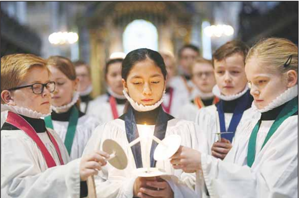
St Paul's Cathedral choristers light candles as they practice ahead of their Christmas schedule, in the quire of St Paul's Cathedral in London, Monday, Dec. 22, 2025. (AP)

WASHINGTON, Dec 22, (AP): The Trump administration is recalling nearly 30 career diplomats from ambassadorial and other senior embassy posts as it moves to reshape the U.S. diplomatic posture abroad with personnel deemed fully supportive of President Donald Trump’s “America First” priorities.