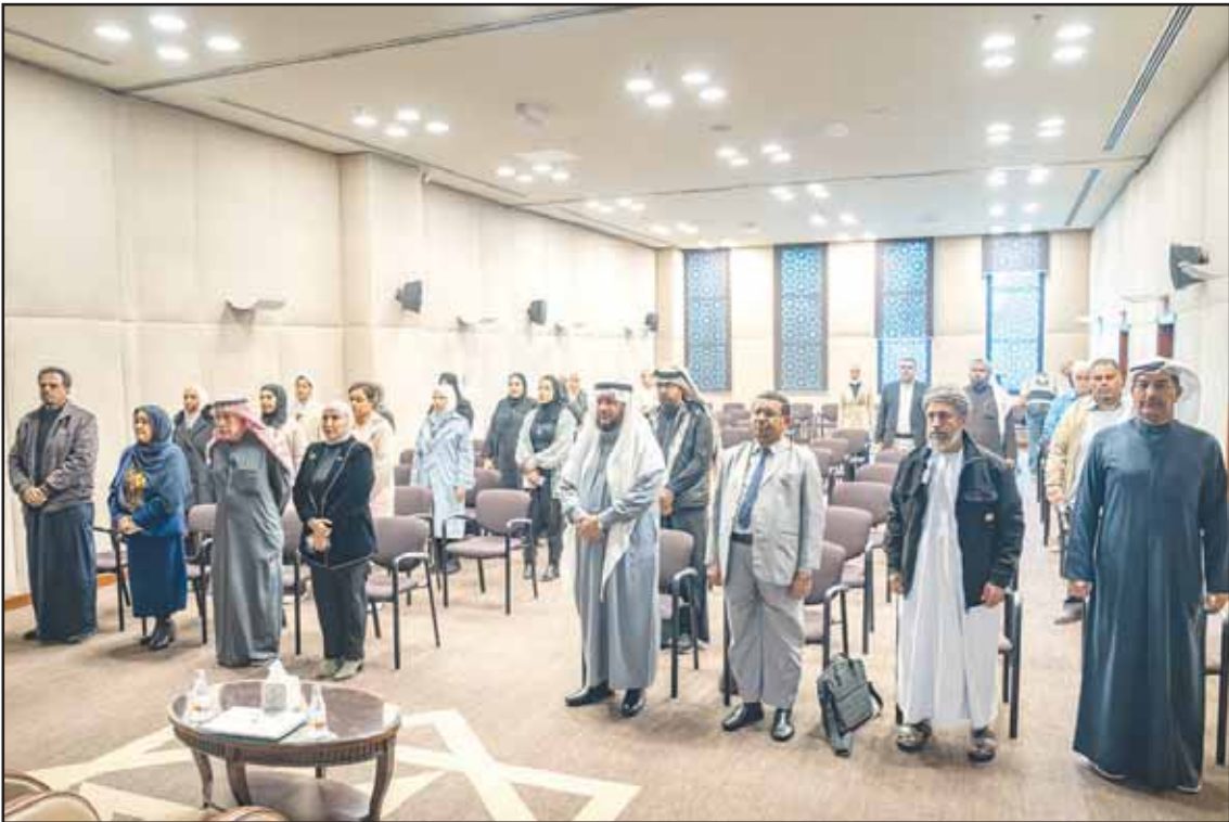
Photo from the forum.