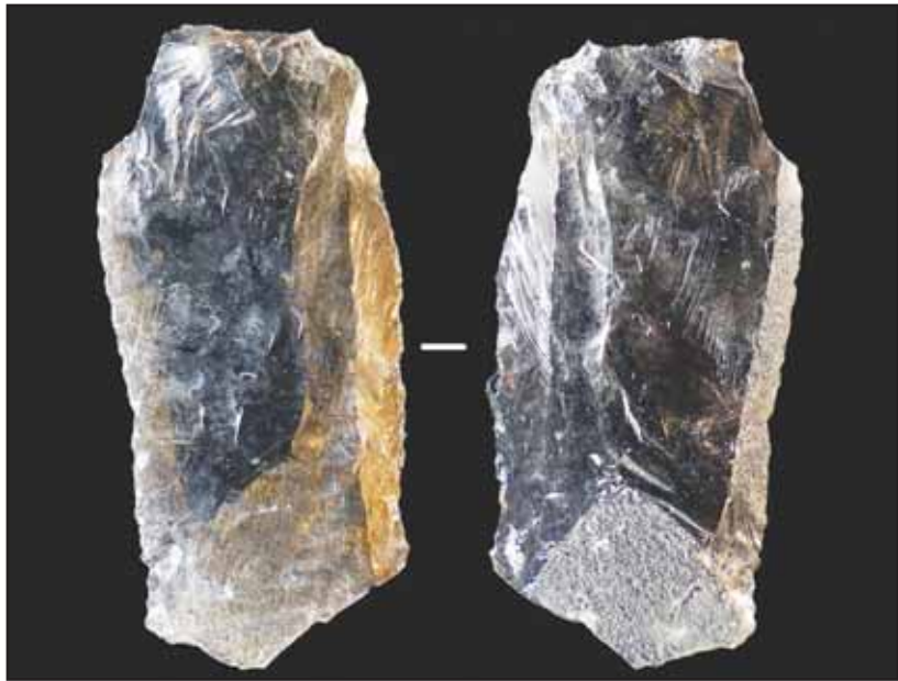
Left: This undated combo photo shows front and back views of a stone artifact unearthed from the Tsungqen Co site in Daocheng County, Garze Tibetan Autonomous Prefecture, southwest China's Sichuan Province. Right: This undated combo photo shows front, back and side views of a stone artifact unearthed from the Tsungqen Co site in Daocheng County, Garze Tibetan Autonomous Prefecture, southwest China's Sichuan Province. (Xinhua)

CHENGDU, Dec 22, (Xinhua) – Chinese archaeologists have uncovered a significant Paleolithic site at an unprecedented altitude on the eastern Qinghai-Tibet Plateau, offering fresh insights into early human migration and adaptability, according to the Sichuan Provincial Cultural Heritage Administration.