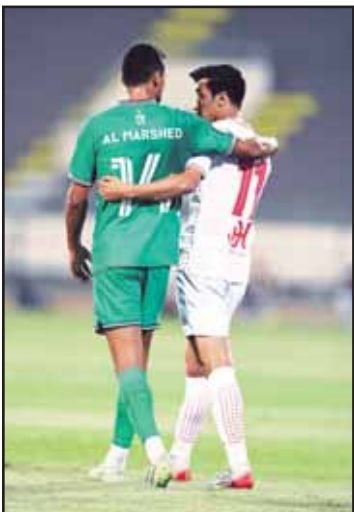
Players show sportsmanship.