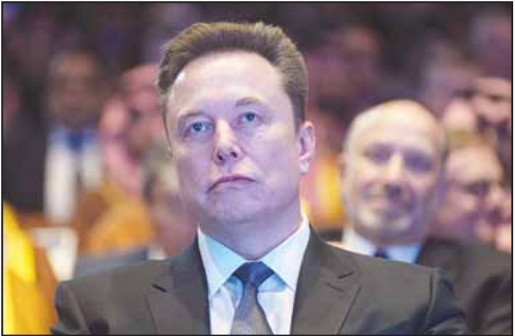
Elon Musk attends the Saudi Investment Forum at the Kennedy Center, Wednesday, Nov. 19, 2025, in Washington. (AP)

Tensions have been rising in the Minneapolis-St. Paul area as federal authorities continue an immigration crackdown. Last week, ICE agents and protesters clashed in neighboring Minneapolis. (AP)