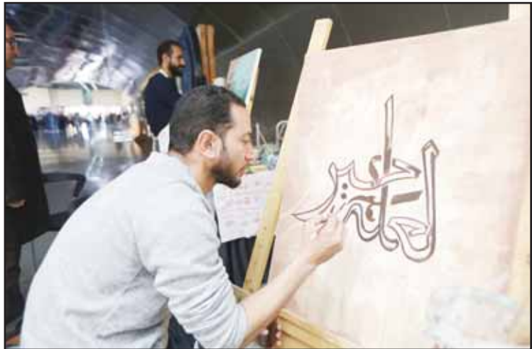
A man demonstrates Arabic calligraphy during an event marking World Arabic Language Day at the National Museum of Egyptian Civilization in Cairo, Egypt.