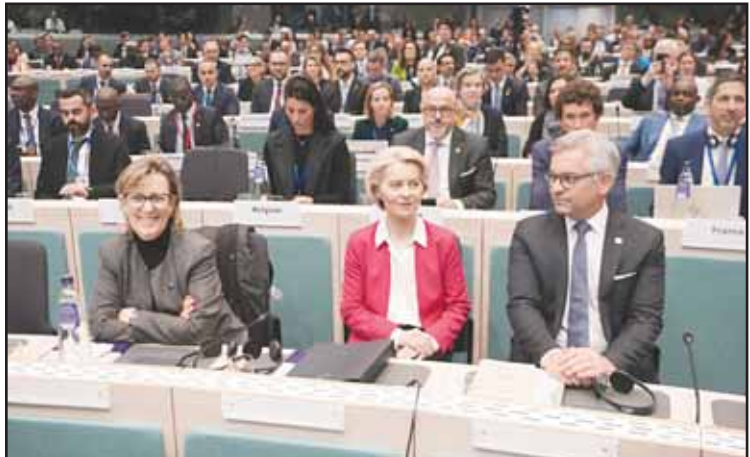
From left: European Commissioner for Financial Services Maria Luis De Albuquerque, European Commission President Ursula von der Leyen and European Commissioner for Internal Affairs and Migration Magnus Brunner attend a Conference of the Global Alliance to Counter Migrant Smuggling at the EU Charlemagne building in Brussels on Dec 10. (AP)

BRUSSELS, Dec 11, (AP): As sympathy for immigrants erodes around the world, European nations agreed Wednesday to consider changes that rights advocates say would weaken migrant protections that have underpinned European law since World War II. The consensus coalesced as mainstream political parties across Europe have adopted tougher migration policies as a way to blunt the momentum of far-right politicians exploiting discontent over immigration, even though illegal border crossings are actually falling. Members of the 46 countries that make up the Council of Europe acknowledged “challenges” posed by migration while reaffirming their respect for the European Convention on Human Rights and the European Court of Human Rights, the council’s secretary general, Alain Bertset, told journalists after discussions in Strasbourg, France. Bertset described the 75-year-old convention as a “living instrument.” While nations reaffirmed their commitment to the rights and freedoms of the convention, they also recognized