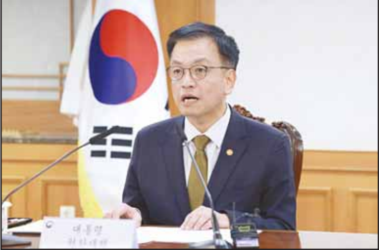
South Korea's acting President Choi Sang-mok speaks during the National Security Council at the government complex building in Seoul, South Korea, on Dec 27, 2024.