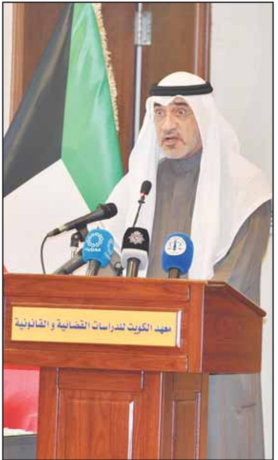
Acting Prime Minister and Minister of Interior Sheikh Fahad Yousef Saud Al-Sabah speaks at a seminar on the new drug law held recently at the Kuwait Institute for Judicial Studies.