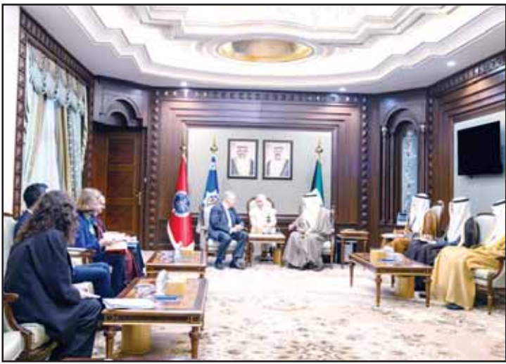
PM Diwan photo Deputy Prime Minister and Minister of Interior Sheikh Fahad Yousef Saud Al-Sabah receives French Minister of Foreign Trade Nicolas Forissier.

KUWAIT CITY, Dec 11: French Minister of Foreign Trade Nicolas Forissier says his visit to Kuwait comes at a crucial moment amid growing momentum in bilateral relations. He noted that both countries are now working according to a clear vision outlined by their leaders during the visit of His Highness the Amir of Kuwait, Sheikh Mishal Al-Ahmad, to Paris on July 14. Minister Forissier expressed his pleasure at meeting with a number of Kuwaiti officials, and thanked the political leadership for their warm welcome. He emphasized that his discussions in Kuwait were in-depth and constructive, adding that he was accompanied by a large delegation of representatives from French companies. During a press conference held at the end of his visit, Minister Forissier explained that he met with Deputy Prime Minister and Minister of Interior Sheikh Fahad Al-Yousef Al-Sabah. They both emphasized the special relationship between Kuwait and France, as well as France's commitment to building a future economic partnership that includes strategic projects agreed upon at the highest level. He also met with Minister of Defense Sheikh Abdullah Al-Ali Al-Sabah and Director General of the Public Authority for Civil Aviation (PACA) Sheikh Hamoud Al-