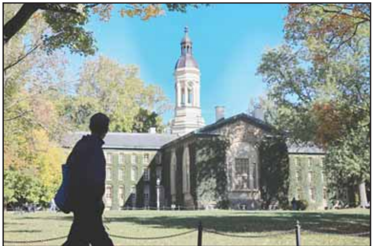
Nassau Hall at Princeton University is seen on Oct 8, 2024, in Princeton, NJ. (AP)

WASHINGTON, Dec 11, (AP): Some of the country’s most prestigious colleges are enrolling record numbers of low-income students - a growing admissions priority in the absence of affirmative action. America’s top campuses remain crowded with wealth, but some universities have accelerated efforts to reach a wider swath of the country, recruiting more in urban and rural areas and offering free tuition for students whose families are not among the highest earners. The strategy could lead to friction with the federal government. The Trump administration, which has pulled funding from elite colleges over a range of grievances, has suggested it’s illegal to target needier students. College leaders believe they’re on solid legal ground. At Princeton University, this year’s freshman class has more low-income students than ever. One in four are eligible for federal Pell grants, which are scholarships reserved for students with the most significant financial need. That’s a leap from two decades ago, when fewer than 1 in 10 were eligible. “The only way to increase socioeconomic diversity is to be intentional about it,” Princeton President Christopher Eisgruber said in a statement. “Socioeconomic diversity will increase if and only if college presidents make it a priority.”