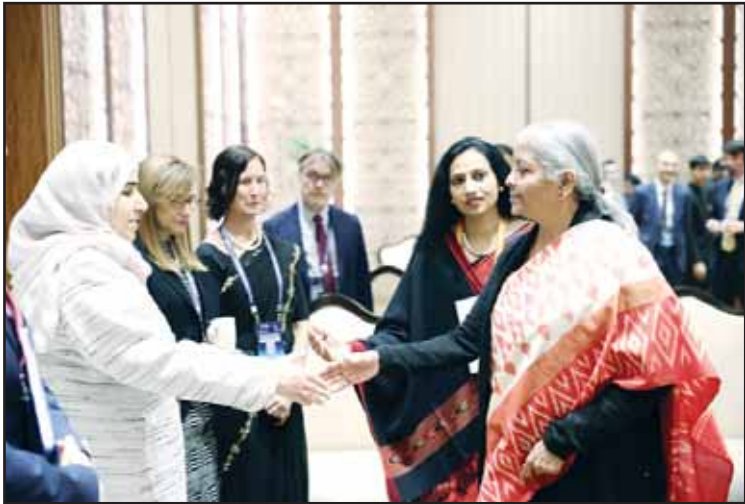
Kuwait participates in Global Forum on Tax Transparency in New Delhi.