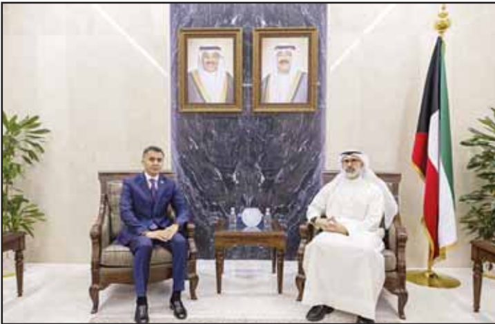
Ministry of Foreign Affairs photos