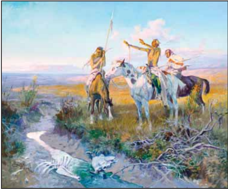
This undated image provided by Christie's shows Charles Marion Russell's painting, 'The Sun Worshippers.'