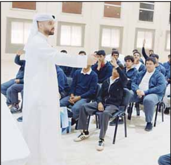
Part of the session.