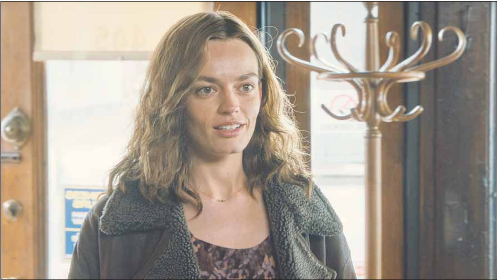
This image released by 20th Century Studios shows Emma Mackey in a scene from ‘Ella McCay.’