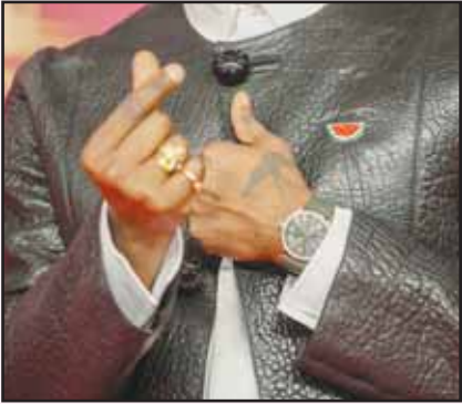
British filmmaker Akinola Davies Jr. gestures while wearing a pro-Palestinian pin during the 22nd Marrakech Film Festival.