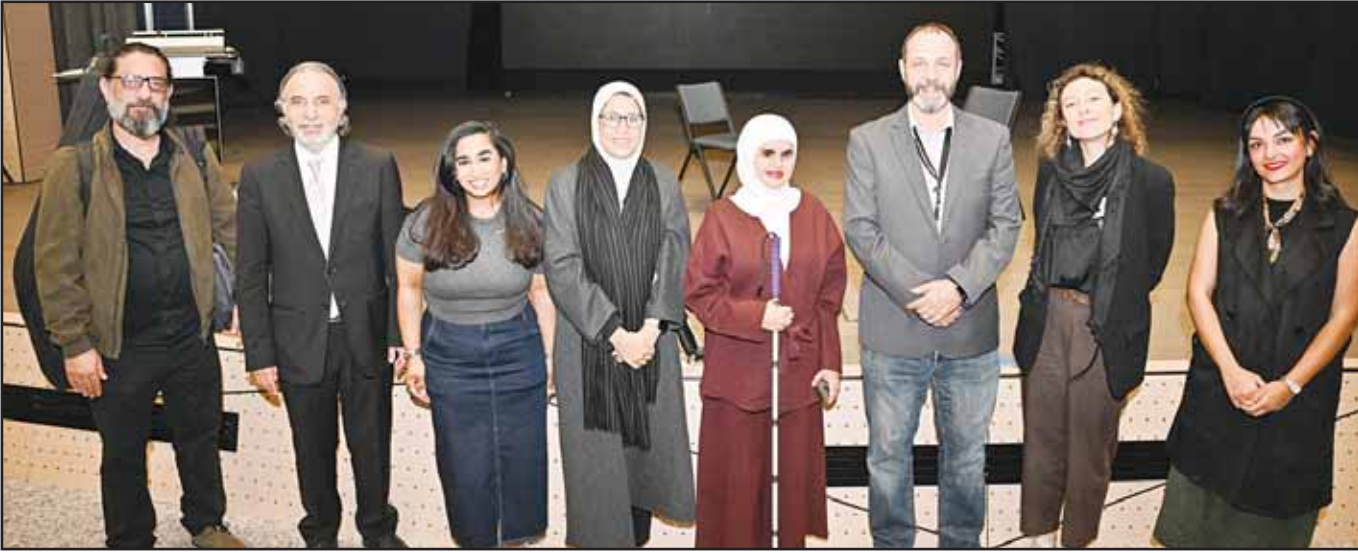
Zain's team and organizers in a group photo at the summit.

KUWAIT CITY, Dec 11: Zain Kuwait's partnership of the Hearth Kuwait 2025 Summit marked the first regional event of its kind in Kuwait dedicated to individual, institutional, community, and environmental wellbeing. Organized by en.v in collaboration with The Wellbeing Project, the three-day Summit was hosted by the American University of Kuwait (AUK). Zain's support for this event builds on the company's Inclusion, Diversity and Equity (IDE) department's 'BE WELL' initiative, a pioneering mental health and wellbeing program launched across Zain's operations to provide employees with practical tools and professional support to manage stress, protect their mental health, and foster healthier workplace cultures.