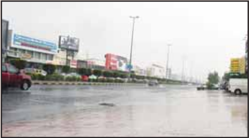
Drivers proceed with caution on slick highways after bouts of thundery rain reduced visibility in parts of Kuwait on Thursday.

Education, Public Works lead weather response