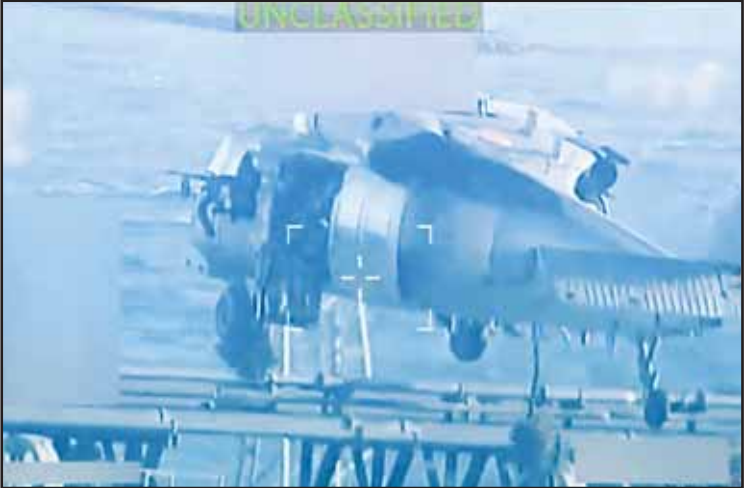
This image from video posted on Attorney General Pam Bondi's X account, and partially redacted by the source, shows an oil tanker being seized by US forces off the coast of Venezuela on Dec 10. (AP)

WASHINGTON, Dec 11, (AP): US President Donald Trump said Wednesday that the United States has seized an oil tanker off the coast of Venezuela as tensions mount with the government of President Nicolás Maduro. Using US forces to take control of a merchant ship is incredibly unusual and marks the Trump administration's latest push to increase pressure on Maduro, who has been charged with narcoterrorism in the United States. The US has built up the largest military presence in the region in decades and launched a series of deadly strikes on alleged drug-smuggling boats in the Caribbean Sea and eastern Pacific Ocean. The campaign is facing growing scrutiny from Congress. "We've just seized a tanker on the coast of Venezuela, a large tanker, very large, largest one ever seized, actually," Trump told reporters at the White House, later adding that "it was seized for a very good reason." Trump did not offer additional details. When asked what would happen to the oil aboard the tanker, Trump said, "Well, we keep it, I guess." The seizure was led by the US Coast Guard and supported by the Navy, according to a US official who was not au-