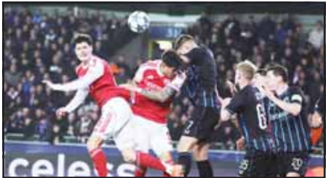
Arsenal's Piero Hincapie, second left, goes up against Brugge's Nicolò Tresoldi, center, during the Champions League opening phase soccer match between Club Brugge and Arsenal in Bruges, Belgium.