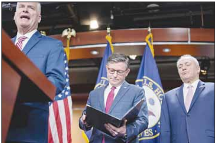
US Speaker of the House Mike Johnson (center), flanked by House Majority Whip Tom Emmer (left), and House Majority Leader Steve Scalise, prepares to speak to reporters following a strategy session with House Republicans, at the Capitol in Washington on Dec 10.

WASHINGTON, Dec 11, The House voted to pass a sweeping defense policy bill Wednesday that authorizes $900 billion in military programs, including a pay raise for troops and an overhaul of how the Department of Defense buys weapons. The bill’s passage on a 312-112 vote comes at a time of increasing friction between the Republican-controlled Congress and President Donald Trump’s administration over the management of the military. The annual National Defense Authorization Act typically gains bipartisan backing, and the White House has signaled “strong support” for the must-pass legislation, saying it is in line with Trump’s national security agenda. Yet tucked into the over-3,000-page bill are several measures that push back against the Department of Defense, including a demand for more information on boat strikes in the Caribbean and support for allies in Europe, such as Ukraine. Overall, the sweeping bill calls for a 3.8% pay raise for many military members as well as housing and facility improvements on military bases. It also strikes a compromise between the political parties - cutting climate and diversity efforts in