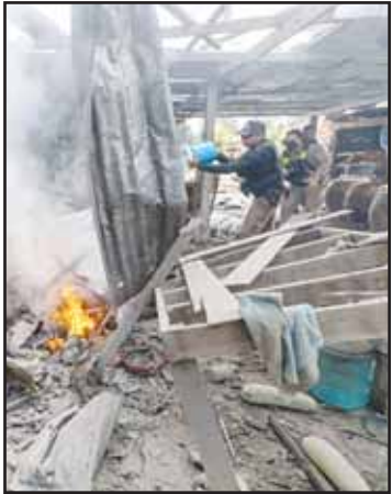
A Thai police officer splashes water to control fire at a house which, Thai local security forces say, was damaged by a Cambodian artillery strike in Surin province, Thailand on Dec 11.