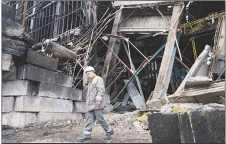
A worker walks in front of a production hall after a recent Russian missile attack at DTEK’s power plant in Ukraine, on Dec 10.

KYIV, Ukraine, Dec 11, (AP): Ukrainian President Volodymyr Zelenskyy was due to hold urgent talks Thursday with leaders and officials from about 30 countries that are supporting Kyiv’s effort to obtain fair terms for an end to the war with Russia. The leaders of Germany, Britain and France were among those expected to take part in the meeting of Ukraine’s allies, dubbed the Coalition of the Willing, via video link. Zelenskyy indicated the talks were hastily arranged as Kyiv officials scramble to avoid getting boxed in by US President Donald Trump’s demands for a swift settlement. European governments are trying to help steer the peace negotiations because they say their own security is at stake. Trump said Wednesday that he and European leaders discussed proposals by phone in “pretty strong terms,” adding that Zelenskyy “has to be realistic” about his country’s position on a peace plan that would cede Ukrainian territory to Russia. He didn’t elaborate.