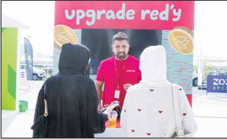
The bank's booth introduces students to the benefits of the red Youth Account.

gagements, Gulf Bank's dedicated sales team emphasized the importance of financial literacy as a life skill, highlighting how early awareness of budgeting, savings, and responsible spending can positively influence students' academic journeys and future careers. The Bank also reinforced its commitment to supporting youth-driven initiatives that contribute to building a more informed, resilient, and opportunity-ready society.