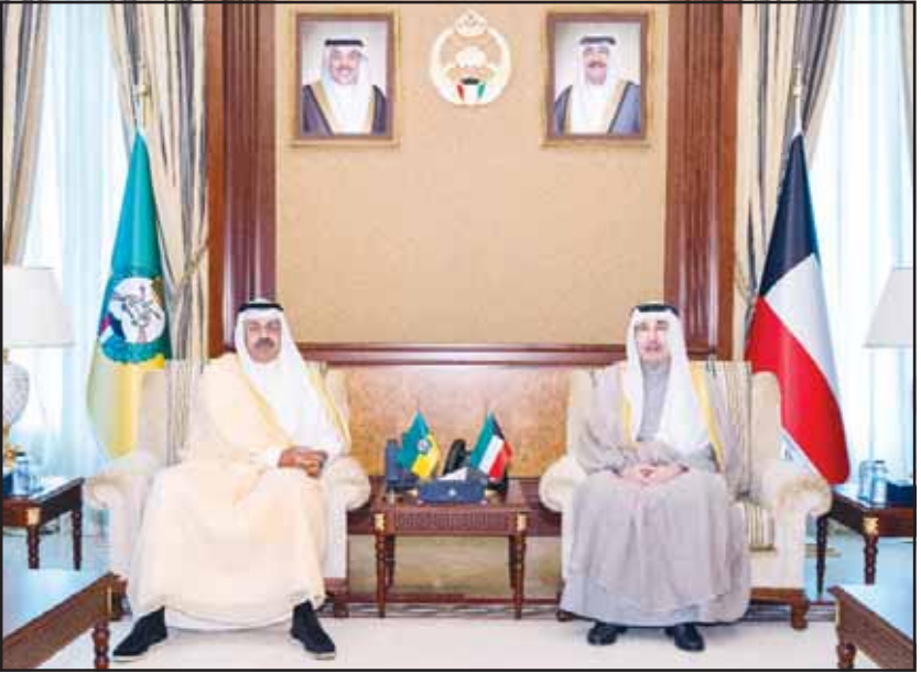
Chairman of Kuwait National Guard (KNG) Sheikh Mubarak Humoud Al-Jaber Al-Sabah receives His Highness Sheikh Ahmad Nawaf Al-Ahmad Al-Jaber Al-Sabah.