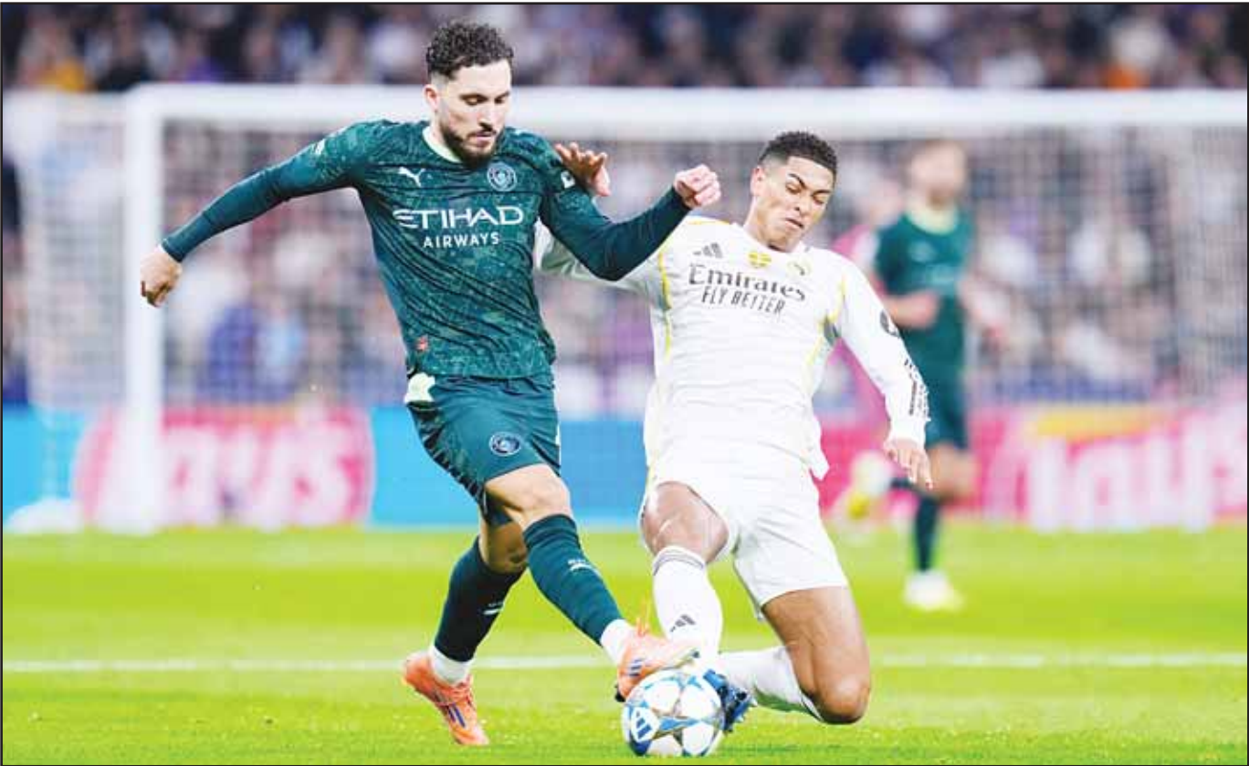
Manchester City's Rayan Cherki, left, vies for the ball with Real Madrid's Jude Bellingham during a Champions League opening phase soccer match between Real Madrid and Manchester City, in Madrid, Spain.

Bellingham said the squad was "100%" behind Alonso.