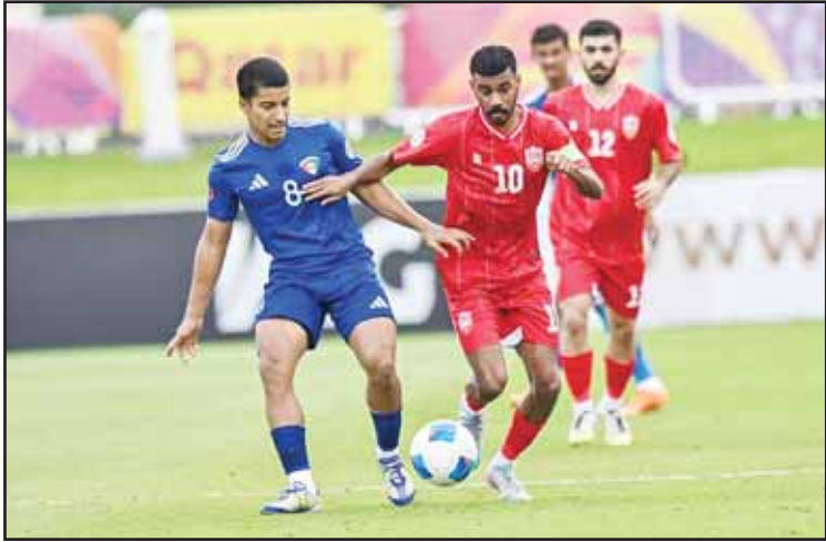
Players challenge for the ball during Kuwait and Bahrain match in Doha.

In the semifinals, the winner of Group A will face the runner-up of Group B, and the Group B winner will meet the Group A runner-up. The two semifinal winners will clash in the final at Stadium 974 in Doha.