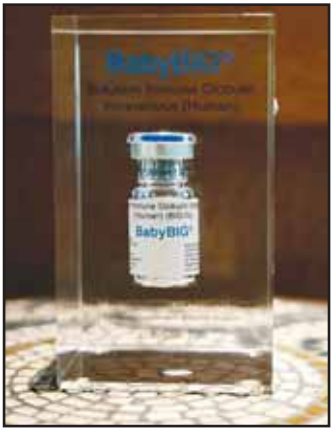
A glass case displaying a vial of BabyBIG, the treatment for infant botulism is shown on Nov 21, in Aos Altos, Calif.