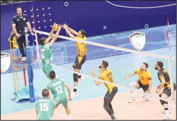
Action from Al-Qadsia as Al-Arabi player rushes to block the spike.