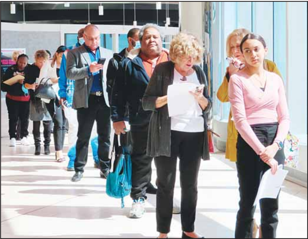
Applicants line up at a job fair at the Ocean Casino Resort in Atlantic City, N.J., on April 11, 2022.

Last week, private payroll data firm ADP es-