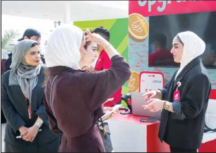
The bank team responds to student inquiries.

The red Account represents a core pillar of Gulf Bank's youth strategy, offering a suite of benefits that go beyond traditional banking. By integrating rewards, entertainment, and experiential learning, the account encourages financial responsibility in a way that resonates with today's fast-moving and digitally engaged generation. Meanwhile, the red Plus prepaid card provides an accessible and secure payment tool that helps young people gain real-world financial experience under a structured and safe framework. During its multiple on-campus en-