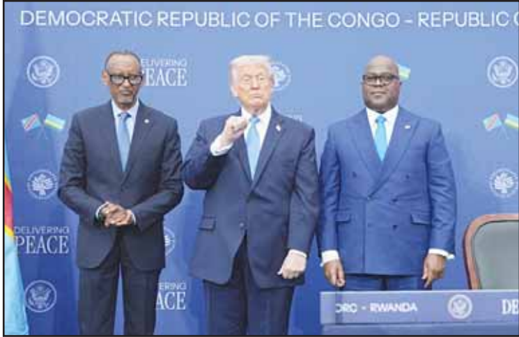
US President Donald Trump stands with Rwanda's President Paul Kagame and Democratic Republic of Congo President Felix-Antoine Tshisekedi at the US Institute of Peace on Dec 4, in Washington.

GOMA, Congo, Dec 11, More than 400 civilians have been killed as the Rwanda-backed M23 armed group continues its offensive in Kivu province in eastern Congo, regional officials said late Wednesday, adding that Rwandan special forces were in the strategic city of Uvira. M23's latest offensive comes despite a US-mediated peace agreement signed last week by the Congolese and Rwandan presidents in Washington. The accord didn't include the rebel group, which is negotiating separately with Congo and agreed earlier this year to a ceasefire that both sides accuse the other of violating. However, it obliges Rwanda to halt support for armed groups and work to end hostilities. "More than 413 civilians (have been) killed by bullets, grenades, and bombs, including many women, children, and young people" in localities between Uvira and Bukavu, the regional capital, the South Kivu government spokesperson said in a statement late Wednesday. "According to the information gathered, the forces present in the city are composed of Rwandan special forces and some of their foreign mercenaries, operating in clear violation of the ceasefire as well as the Washington and Doha agreements, in total disregard of the commitments made," the statement added.