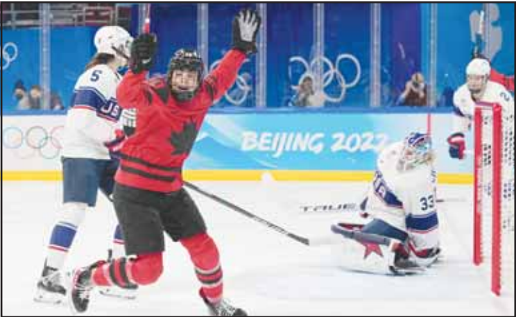
In this file photo, Canada's Sarah Nurse (20) celebrates a goal during the women's gold medal hockey game against the United States at the 2022 Winter Olympics in Beijing.

Daly said the completion date of the main rink is set for Feb. 2, three days before the women’s tournament opens and nine days before the men begin play.