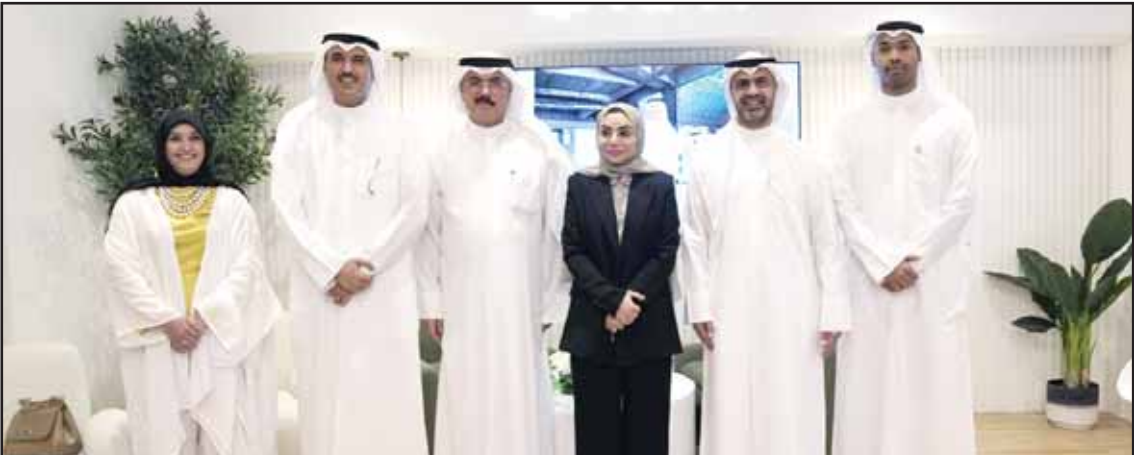
Kuwait Finance House pavilion.

On this occasion, KFH Executive Manager Social Me-