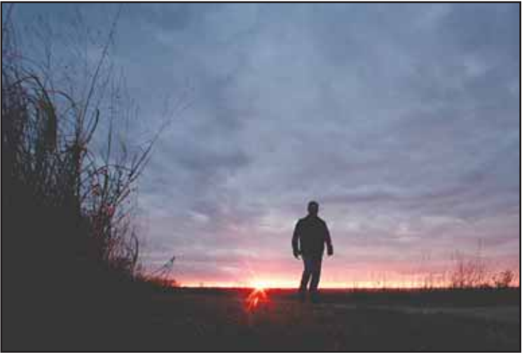
A man walks along a trail during sunset near Manhattan, Kansas on Nov. 20, 2015. (AP)

NEW YORK, Dec 11, (AP): The US suicide rate dropped slightly last year from some of the highest levels ever reported, preliminary data suggests. Experts say it’s hard to know exactly why, or whether the decline will continue. A little over 48,800 suicide deaths were reported in 2024, according to provisional data from the Centers for Disease Control and Prevention, roughly 500 fewer than the year before. The overall suicide rate fell to 13.7 per 100,000 people. Suicides rose for nearly two decades aside from a two-year drop around the beginning of the COVID-19 pandemic. Then they shot up again, to more than 14 per 100,000 from 2021 to 2023. Experts caution that suicide - the nation’s 10th leading cause of death in 2024 - is complicated and that at-