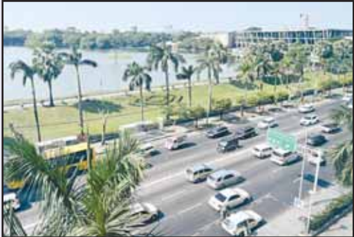
A high-angle view of a busy road with famous Inya Lake in the background in Yangon, Myanmar on Dec 10. (AP)

to join a "silent strike" on Wednesday. It called on the public to stay inside homes or workplaces from 10 am to 3 pm on International Human Rights Day. The tactic has been used on special occasions since the military takeover. Images on social media showed uncrowded streets in Yangon, Myanmar's largest city, and elsewhere. Also on Wednesday, the state-run Myanma Alinn newspaper reported that authorities were seeking the arrest of the 10 activists under a section of a new election law that carries a maximum penalty of 10 years in prison for disrupting the electoral process. (AP) □ □ □ 3 killed in north China building fire: Three people were killed in a blaze on Wednesday evening in Linfen City, north China's Shanxi Province, according to local authorities on Thursday. The fire broke out in a building in the Yaodu District at around 8 p.m. on Wednesday and was extinguished about six hours later. Three people in an internet cafe on the second floor died in the accident, according to the publicity department of Yaodu. The cause of the fire is under investigation. (Xinhua)