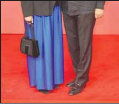
A couple poses for a photo on the red carpet during the opening ceremony of the 22nd Marrakech Film Festival, in Morocco.