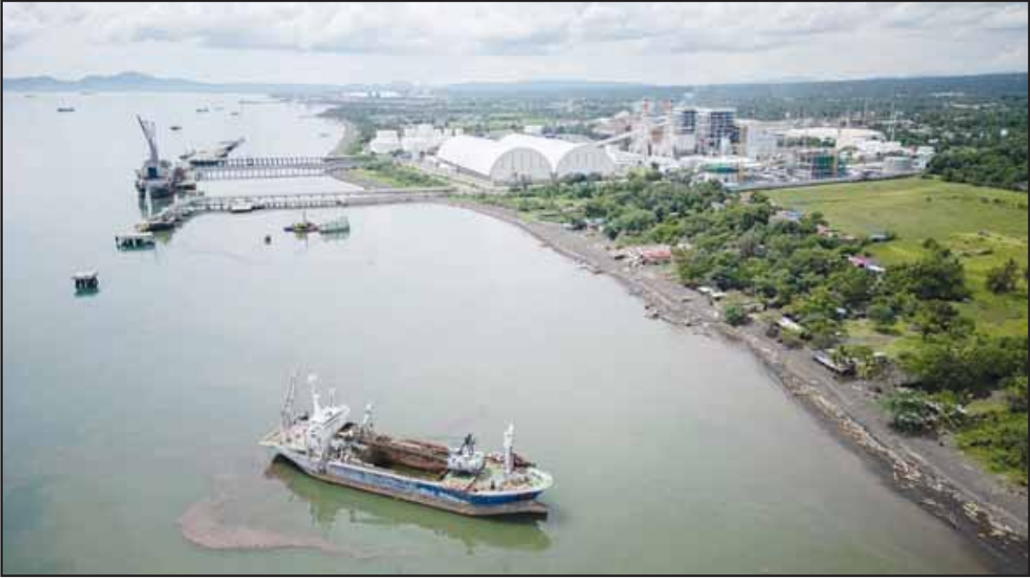
A semi-submerged freighter lists by the coast of the South Luzon Thermal Energy Power Plant in Calaca, Batangas in the Philippines on Oct 4. (AP)

CALACA, Philippines, Dec 11, (AP): The Philippines is testing a new type of carbon credit aimed at encouraging companies to cut their climate warming emissions by creating funds that can be used to turn coal-fired power plants into renewable energy facilities. Called transition credits, they are meant to help pay for phasing out coal use by creating value out of the emissions that would prevent. The funds would then pay to replace fossil fuel equipment with clean energy gear. Proponents say transition credits could unlock a windfall of investment for the power hungry Asia-Pacific region and speed up Southeast Asia’s transition to renewable energy. But some experts wary of longstanding problems in the carbon market view them as a dead end. A carbon credit represents one metric ton of carbon dioxide removed or not sent into the atmosphere. Credits are bought and sold on carbon markets by countries and companies trying to comply with emission regulations, meet pollution reduction targets or offset environmental impacts. Transition credits differ because they put a value on prevented future emissions caused by burning fossil fuels, which contributes to climate change. But integrity concerns plague carbon credit projects around the world. Projects meant to save carbon-absorbing forests have been accused of greenwashing, miscalculations and causing carbon leakage, a term for