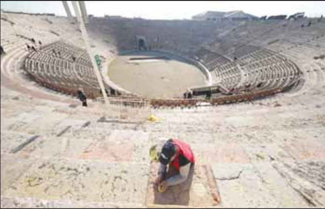
A worker removes seat number stickers used to mark places during concerts at the Arena of Verona, Italy.