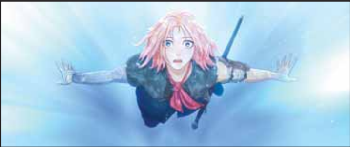
This image released by Netflix shows the character Scarlet in a scene from the animated film ‘Scarlet.’

Hosoda, a former Studio Ghibli animator whose other films include “Wolf Children” and “Summer Wars,” has an extraordinary knack for crafting anime worlds of visual complexity while pursuing existential ideas with a childlike sincerity. But an excess of baroque design, of emotion, of scope, sinks Hosoda’s “Scarlet.” It’s the kind of misfire you can forgive. If you’re going to fail by overreach, it might as well be with a wildly ambitious rendering of “Hamlet.”