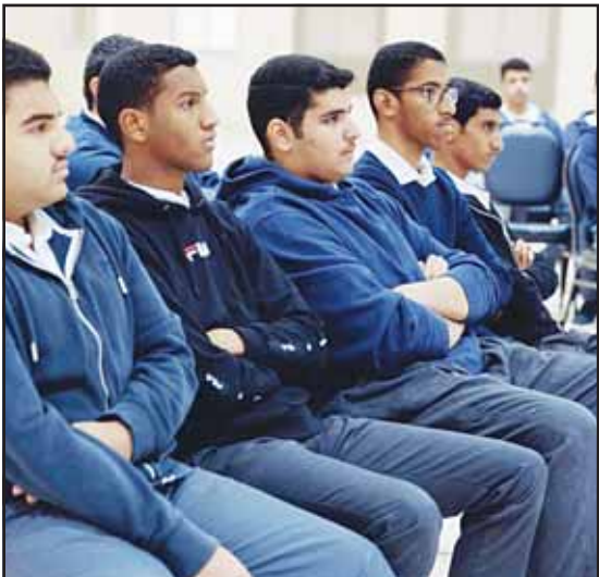
Students of Ahmed Al-Adwani High School