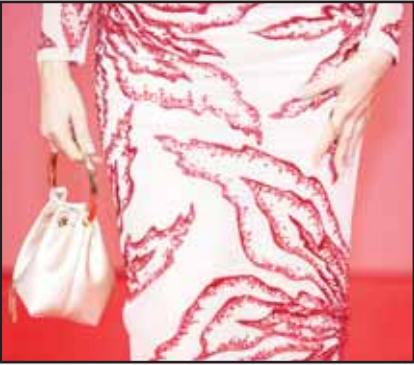
An actress poses for a photo on the red carpet during the 22nd Marrakech Film Festival, in Morocco.