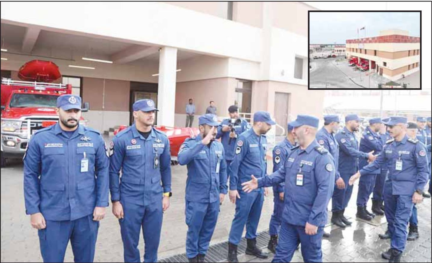
Chief of Kuwait Fire Force Major General Talal Al-Roumi visits a fire station. Inset: A new fire station opposite the sea.