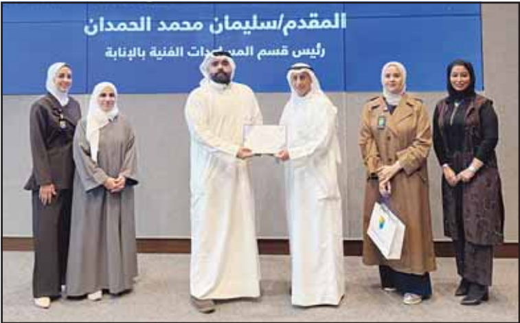
Certificates of appreciation distributed to distinguished guests.