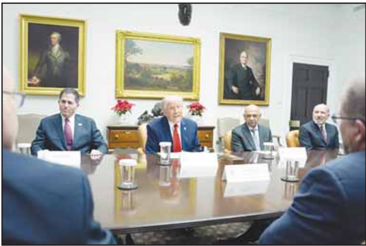
Flanked by CEO of Dell, Michael Dell, left, CEO of IBM Arvind Krishna, second right, and Secretary of Commerce Howard Lutnick, (right), listen to US President Donald Trump during a roundtable discussion with business leaders in the Roosevelt Room of the White House on Dec 10 in Washington.

card, effectively offering permanent legal residency with the chance for citizenship. “Basically, it’s a green card but much better,” Trump said. “Much more powerful, a much stronger path.” The president made no mention of requirements for job creation for applying corporations or on overall caps on the program, which exist under the current EB-5 program. Instead, he said he’d heard complaints from business leaders who had been unable to recruit outstanding graduates from U.S. universities because they were from other countries and lacked permission to stay. “You can’t hire people from the best colleges because you don’t know whether or not you can keep the person,” Trump said. Trump has built his political career around clamping down on the U.S.-Mexico border and championing hard-line immigration policies. His second administration spent its first 10-plus months launching mass deportation pushes and sweeping immigration crackdowns that have targeted cities including Los Angeles and Charlotte. But he’s also drawn criticism from leading voices of his “Make America Great Again” movement for repeatedly suggesting that skilled immigrants should be allowed into the U.S. - something the gold card program could facilitate.