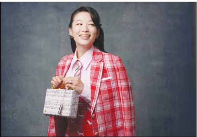
Actor Arden Cho poses for a portrait in Los Angeles.

writers behind HUNTR/X have leaned into as the film's publicity tour grinds into Hollywood's awards season. "I just feel so blessed to be able to have these conversations because I am so proud to be, obviously, to be American, but at the same time, I'm also so proud to be Korean," Cho said. Growing up in Texas and Minnesota, she hadn't thought much about racial identity. But while attending college at University of Illinois Urbana-Champaign, something shifted. "I realized that was the first time when I was like, oh, people look at me and don't think that I'm an American," she recalled. "And it was interesting because I realized at that time, there are two ways to look at it. You can just be mad and say, 'Oh, I hate that we don't have representation, I hate people that don't see us, I hate that people don't see our stories,' or you can say, 'I'm going to try.'" So she tried. In 2007, she moved to Los Angeles. "It was tough to leave my friends and family behind, it was tough to stay positive and to have thick skin. I still don't have thick skin," she said. She found success as superpowered Kira Yukimura on MTV's "Teen Wolf" series starting in 2014 but oth-