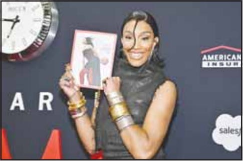
Athlete of the year honoree A'ja Wilson attends the A Year in TIME honors gala at Current at Chelsea Piers in New York.

This season was different for Wilson and the Aces, who had cruised to their previous two titles as a heavy favorite. This year, with a month to go, the Aces were sitting at .500 and were in danger of missing the playoffs after coming off a record 53-point loss against Minnesota. Wilson rallied her team to wins in the final 16 regular-season games to secure the No. 2 seed, and Las Vegas went on to win the championship. “This season I found myself through the adversity and mud we went through,” she said. Despite her numbers being on par with her unanimous MVP season the year before, Wilson heard the chatter that she wasn’t playing as well and that she wasn’t the front-runner to repeat as the league’s top player. The 29-year-old used that as fuel on the court. She led the league with 23.4 points and 2.3 blocks per game. “The way they talk about us, the way they talk about me, I’m ready for that, I’m ready for the noise,”