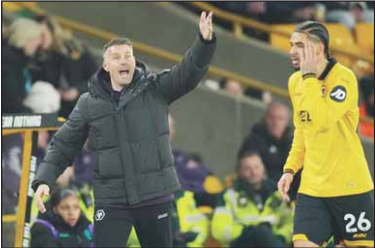
Wolverhampton Wanderers' head coach Vitor Pereira reacts during the Premier League soccer match between Wolverhampton Wanderers and Manchester United in Wolverhampton, England.

Wolves appear to be paying the price for a talent drain in recent years, which