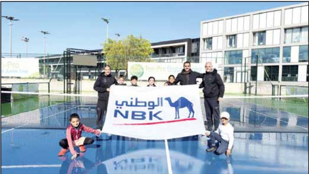
Mallorca group photo