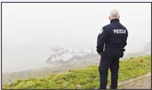
A Croatian police officer looks from the shore of Sava river near the site where a boat carrying migrants from Bosnia overturned in eastern Croatia, in Slavonski Brod on Dec 11.

Parmelin elected Swiss prez for 2026: The Swiss parliament elected Economics Minister Guy Parmelin as President of the Swiss Confederation for 2026 on Wednesday. Parmelin, 66, from the Swiss People’s Party, secured 203 votes out of the 228 ballots cast. According to Swiss media outlet swissinfo, this marks the highest vote count recorded so far this century. Parmelin has served as the head of the Federal Department of Economic Affairs, Education and Research since 2019. He was the vice president of the Swiss Confederation for 2025, and previously held the rotating presidency in 2021. Swiss Foreign Minister Ignazio Cassis will serve as vice president of the Swiss Confederation for 2026. Both Parmelin and Cassis will assume their new offices on Jan. 1. Each December, the Swiss parliament elects the President of the Swiss Confederation from the seven members of the Federal Council for a one-year term. The president, regarded as first among equals, serves as the formal head of Switzerland’s seven-member executive branch while continuing their regular ministerial responsibilities. (Xinhua)