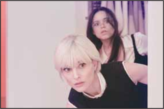
Natalie Portman, foreground, and Jenna Ortega appear in a scene from ‘The Gallerist,’ an official selection of the 2026 Sundance Film Festival.

Ever a festival of discovery, of the 90 features culled from 4,255 submissions, 40% are from first-time directors. The programmers laugh when they hear people say things like “that’s a Sundance movie,” as if it’s one, easily categorizable thing.