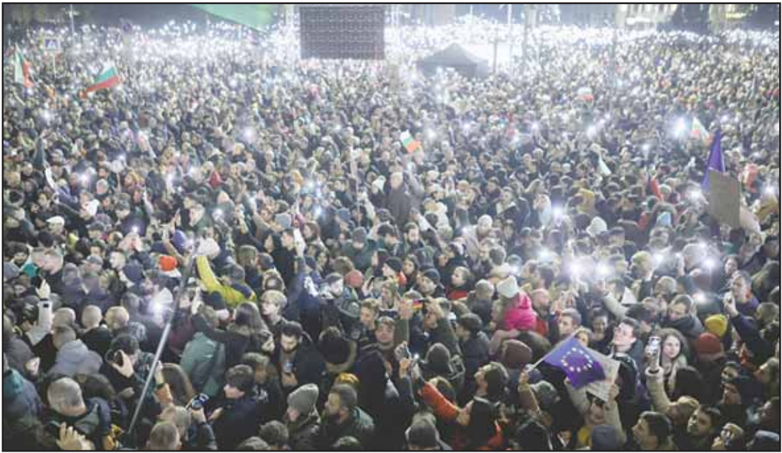
Protesters light their phones as torches as a swelling crowd of tens of thousands of Bulgarians filled Sofia’s central square, demanding the government’s resignation amid rising anger over corruption and contested economic policies, Sofia, Bulgaria on Dec 10.

peace proposals together with U.S. officials over the weekend. There may also be talks in Berlin early next week, with or without American officials, he said.