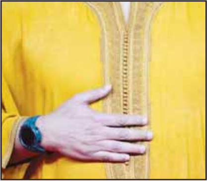
A Moroccan actor wearing a traditional outfit poses for a photo on the red carpet during the 22nd Marrakech Film Festival. (AP)

MARRAKECH, Morocco, Dec 11, (AP): The carpet outside the 2025 edition of the Marrakech International Film Festival was unfurled in its usual red, but the stars who walked across it shimmered in every color. Actors and filmmakers drifted down its length in embroidered velvet robes and delicately cut black lace dresses, amid the sounds of camera shutters and microphones