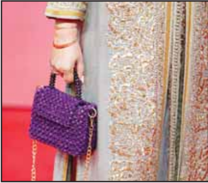
An actress poses for a photo on the red carpet during the 22nd Marrakech Film Festival, in Morocco.