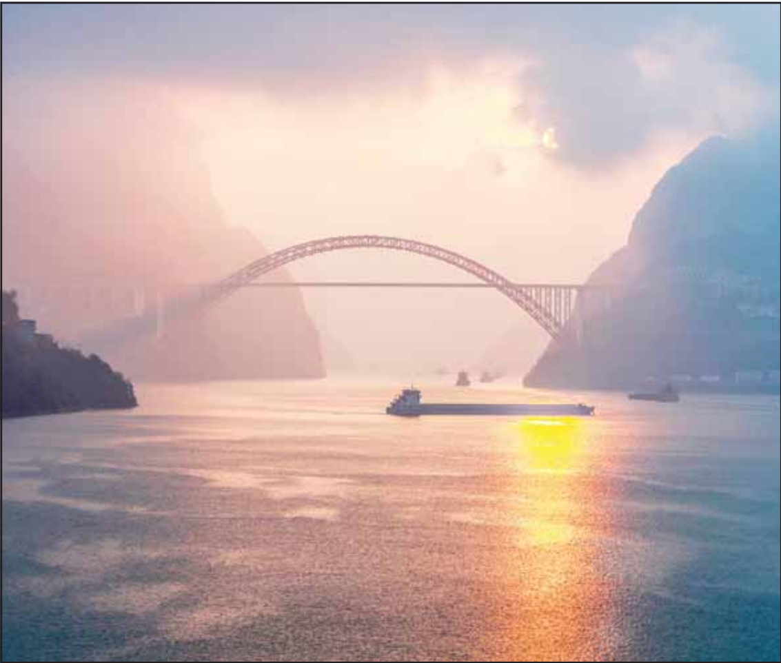
Ships sail on the Yangtze River near the Xiling Gorge in Zigui County, central China's Hubei Province on Dec 6.

HKSAR's disaster-relief efforts in the deadly fire in the residential complex Wang Fuk Court, and attacked and interfered with the Legislative Council General Election, said the office in a statement about its talks with directors and journalists of some foreign media outlets operating in Hong Kong on Saturday.