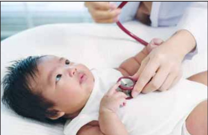
Children are most likely to get infected by hepatitis B at birth, when contact with their mother's blood can transmit the virus.

medicine specialist who studies vaccine delivery and policy. Vaccinating babies for hepatitis B at birth remains one of the clearest, most evidence-based ways to keep American children free of this lifelong, deadly infection. In September 2025, the Advisory Committee on Immunization Practices, or ACIP, an independent panel of experts that advises the CDC, debated changing the recommendation for a dose of the hepatitis B vaccine at birth, but ultimately delayed the vote. This committee regularly reviews vaccine guidance. However, since Secretary of Health and Human Services Robert F. Kennedy Jr. disbanded the entire committee and handpicked new members, its activity has drastically departed from business as usual. The committee has long-standing procedures for evaluating evidence on the risks and benefits of vaccines, but these procedures were not followed in the September meeting and were not followed for this most recent decision. The committee's new recommendation keeps the hepatitis B vaccine at birth for infants whose mothers test positive for the virus. But the committee now advises that infants whose mothers test negative should consult with their health care provider. Parents and health care providers are instructed to weigh vaccine benefits, vaccine risks and infection risks using