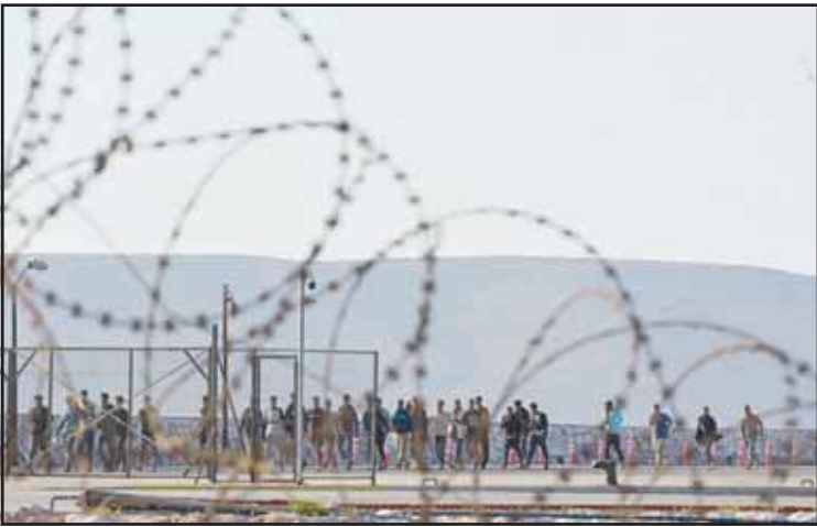
Migrants rescued south of Crete walk after their arrival at the the port of Lavrio, Greece, on July 10.

ATHENS, Greece, Dec 7, (Agencies): At least 18 migrants attempting to cross the Mediterranean Sea in an inflatable boat died when it capsized south of the island of Crete, Greek authorities said Saturday. The half-sunken boat was located Saturday by a passing Turkish merchant vessel, authorities said. Two survivors were rescued and a rescue operation to find more was ongoing. Greece is a major entry point into the European Union for people fleeing conflict and poverty in the Middle East, Africa and Asia and fatal accidents are a common occurrence. The short but perilous journey from Turkey’s coast to nearby Greek islands in inflatable dinghies or small boats, often in poor conditions, used to be the major route until increased patrols and alleged pushbacks reduced crossing attempts. In recent months, arrivals from Libya to Crete have surged. Authorities have not yet determined where the boat came from. A ship and a plane from European border agency Frontex, a Greek Coast Guard helicopter and three merchant