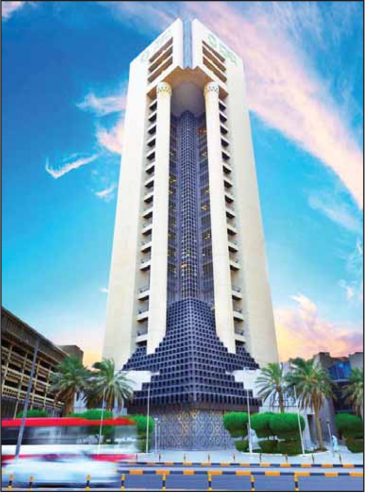
KFH head office

The Zain Insure app can be downloaded from the Apple AppStore and Google Play Store.