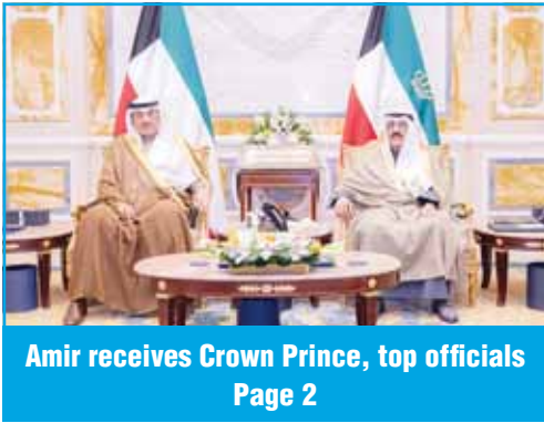
Amir receives Crown Prince, top officials Page 2