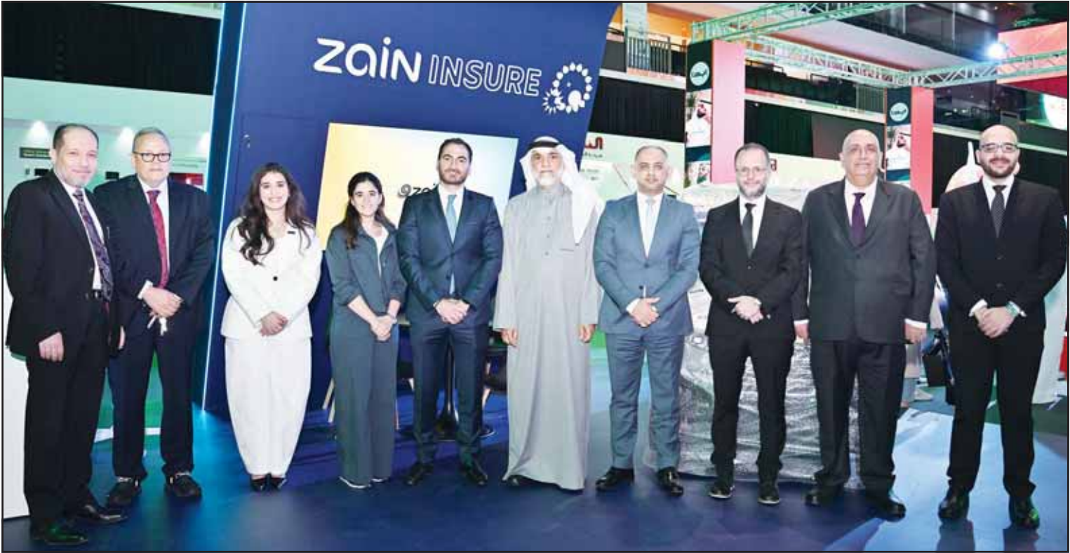
Hammoud and Al-Khuzam with Zain and Boubyan Takaful executives.

Additionally, the forum serves as a key step for exchanging regional and international expertise and translating knowledge into practical applications that support the future of the construction sector in GCC countries. It also represents as a national and regional platform to enhance the efficiency of the construction sector in Kuwait through digital transformation, smart city applications, facilities management, and higher standards of quality and sustainability.