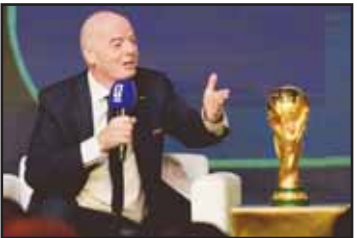
FIFA President Gianni Infantino speaks during the match schedule reveal for the 2026 soccer World Cup in Washington, Saturday, Dec. 6, 2025.

at Azteca can be, in terms of both the temperature and the altitude, for visiting teams. But in this tournament, almost all the games at the three Mexican venues are at night. Here are the group stage games where heat is most likely to be an issue at kickoff. This is based on 30-year averages of Accuweather's "RealFeel" temperature. Because of their roofs, Arlington, Houston and Atlanta are not included. All times local: 88 degrees - Switzerland vs. Winner of European Playoff A (June 18 at 12 p.m. in Inglewood) 87 degrees - Belgium vs. Iran (June 21 at 12 p.m. in Inglewood) 87 degrees - Curaçao vs. Ivory Coast (June 25 at 4 p.m. in Philadelphia) 86 degrees - Tunisia vs. Netherlands (June 25 at 6 p.m. in Kansas City, Missouri) 85 degrees - Scotland vs. Brazil (June 24 at 6 p.m. in Miami Gardens, Florida) 85 degrees - Ecuador vs. Germany (June 25 at 4 p.m. in East Rutherford, New Jersey) 85 degrees - Norway vs. France (June 26 at 3 p.m. in Foxborough, Massachusetts) 84 degrees - Qatar vs. Switzerland (June 13 at 12 p.m. in Santa Clara, California) 84 degrees - Uruguay vs. Cape Verde (June 21 at 6 p.m. in Miami Gardens) 84 degrees - South Africa vs. South Korea (June 24 at 7 p.m. in Monterrey) 84 degrees - Saudi Arabia vs. Uruguay (June 15 at 6 p.m. in Miami Gardens)