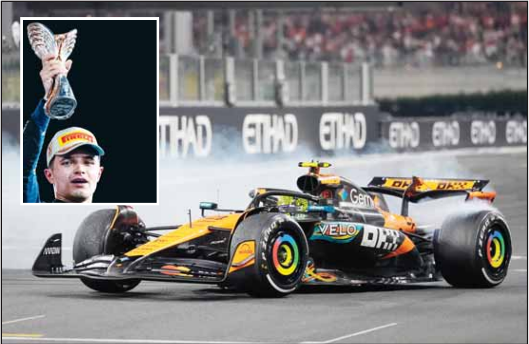
McLaren driver Lando Norris of Britain burns tires after becoming a world champion after the Abu Dhabi Formula One Grand Prix in Abu Dhabi, United Arab Emirates. Inset: Norris celebrates after becoming a world champion.

Verstappen's astounding late-season charge came close to unseating both McLaren drivers after they had shared the lead throughout the season and then were undone by driver