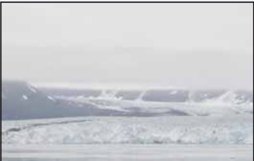
Hubbard Glacier, located near Yakutat, Alaska, is seen on Aug 1, 2024.