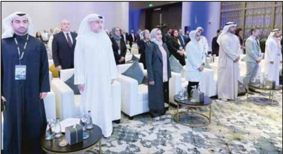
Healthcare leaders and oncology experts gather at the inaugural Kuwait Oncology Conference, marking a new chapter in advanced cancer care and patient-centered treatment.