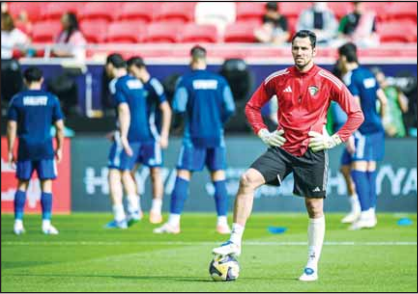
Players hold training ahead of the key clash against UAE.