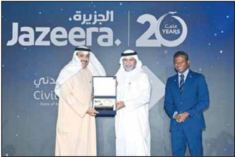
General Directorate of Civil Aviation

promise increased innovation and efficiency, critics note a pattern of reduced competition, job cuts, and stagnant industry wages following consolidation. Regulators, particularly in the United States and Europe, are expected to scrutinize the proposal closely. The merger would boost Netflix's global base to more than 130 million subscribers, raising concerns about subscription price hikes and shrinking content choices for consumers. The U.S. Department of Justice has already confirmed that the deal will undergo review—a process that could extend for up to a year. While, Netflix anticipates it will take 12 to 18 months to fully complete the merger deal. Financial terms of the agreement allocate each Warner Bros. Discovery shareholder $23.25 in cash and approximately $4.50 in Netflix stock per share, valuing the company at $27.75 per share—an equity valuation of roughly $72 billion and $82.7 billion when debt is included. The deal also features substantial breakup fees: Netflix has agreed to pay $5.6 billion if the acquisition falls through, while Warner Bros. would owe $2.8 billion should it withdraw. As the deal moves into regulatory evaluation, stakeholders across the entertainment industry—and millions of subscribers—wait to see whether this blockbuster merger will reshape streaming for the better or concentrate power in ways that reshape entertainment access for years to come.