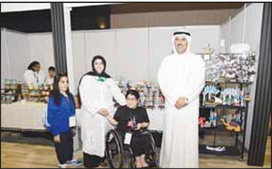
Top and above: Governor Sheikh Hamoud Jaber Al-Ahmad Al-Sabah attends the Ahmadi Exhibition for Supporting Small Businesses 2025.