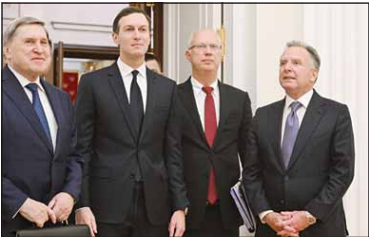
US special envoy Steve Witkoff, (right), Russian presidential foreign policy adviser Yuri Ushakov, (left), Russian Direct Investment Fund CEO Kirill Dmitriev, (second right), and Jared Kushner, US President Donald Trump’s son-in-law, arrive for meetings in Moscow, on Dec 2.

KYIV, Ukraine, Dec 7, Russian missile and drone attacks overnight into Sunday killed at least one person in Ukraine, after U.S. and Ukrainian officials wrapped up a third day of talks aimed at ending the war. A man was killed in a drone attack on Ukraine’s northern Chernihiv region Saturday night, local officials said, while a combined missile and drone attack on infrastructure in the central city of Kremenchuk caused power and water outages. Kremenchuk is home to one of Ukraine’s biggest oil refineries and is an industrial hub. Kyiv and its Western allies say Russia is trying to cripple the Ukrainian power grid and deny civilians access to heat, light and running water for a fourth consecutive winter, in what Ukrainian officials call “weaponizing” the cold. The latest round of attacks came as Ukrainian President Volodymyr Zelenskyy said Saturday evening he had a “substantive phone call” with American officials engaged in talks with a Ukrainian delegation in Florida. He said he had been given an update over the phone by US and Ukrainian officials at the talks. “Ukraine is determined to keep