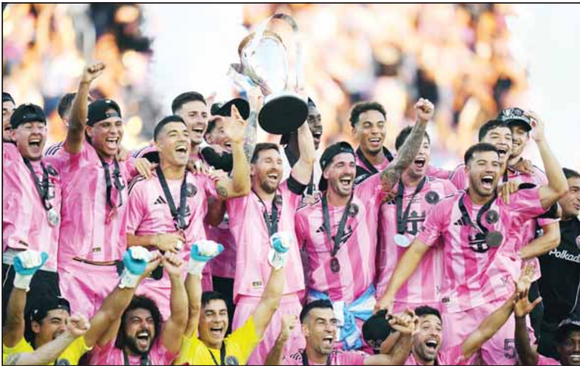
Inter Miami's Lionel Messi hoists the trophy alongside teammates after defeating the Vancouver Whitecaps in the MLS Cup final soccer match, in Fort Lauderdale, Fla.

He didn't need an MLS Cup. But he wanted one - and got it. Messi and Inter Miami have completed their ascent, beating the Vancouver Whitecaps 3-1 on Saturday in the MLS Cup final for the franchise's first championship. It came 2 1/2 years after the legend arrived in South Florida, a move that stunned plenty of on-lookers at the time. He led the team to a Leagues Cup trophy in 2023, the MLS Supporters' Shield last year before a first-round playoff loss - and now, they grabbed MLS' biggest prize. "Last year we went out early in the league and were eliminated in the first round," Messi said in Spanish afterward. "This year, winning MLS was one of our main objectives. The team made a huge effort - it was a very long year, with many matches - and we were up to the task all season." Messi set up the title-clinching goal with a 72nd-minute assist to Rodrigo De Paul, a play where Messi stole the ball and threaded a pass through a tiny gap in a wall of Vancouver defenders. De Paul got it in stride, pushed it into the far corner of the net - and Messi