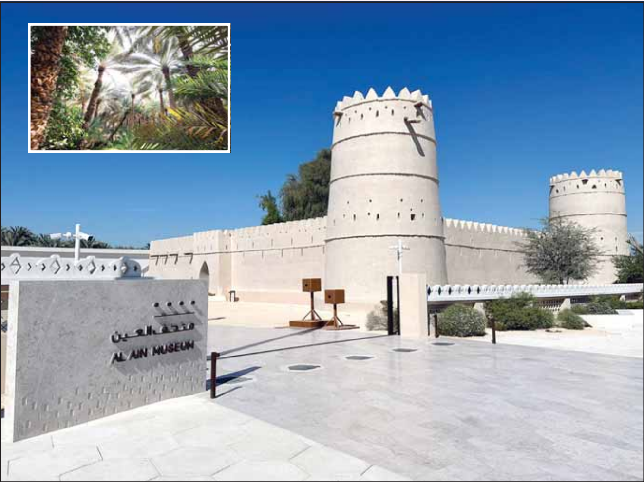
Al Ain Museum (Inset) Al Ain Oasis