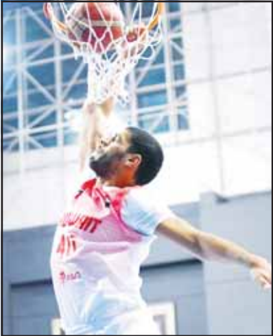
Kuwaiti player drives in for the score.

Despite Kuwait Club's dominance over Qadsia in recent seasons, Qadsia remains one of the few teams capable of challenging the White team and securing an upset.