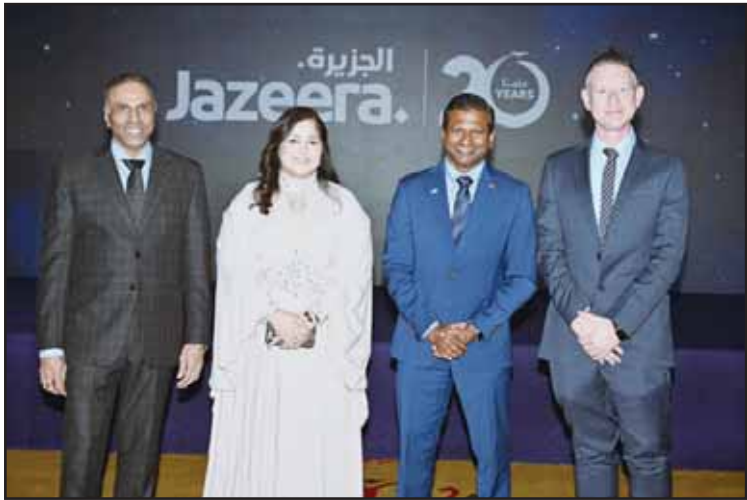
Jazeera Executive Management