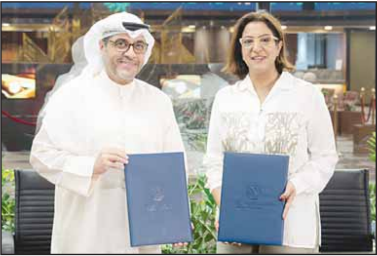
Boursa Kuwait teams up with INJAZ Kuwait to boost youth financial literacy.

Financial literacy is one of the strategic pillars of Boursa Kuwait’s corpo-