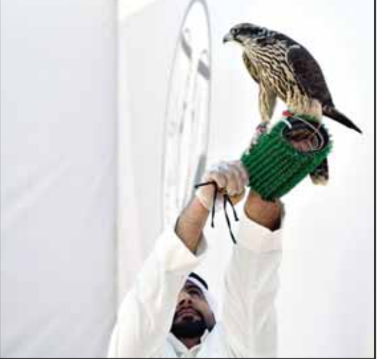
Highlights from the final day of the UAE World Falcon Racing Cup.

KUWAIT CITY, Dec 7, (KUNA): The United Arab Emirates and Secretary General of the International Federation for Falconry Sports and Racing Rashed bin Markhan commended Kuwait’s outstanding organization of the first UAE World Falcon Racing Cup, saying the high professionalism shown made this heritage sporting event comparable to major international championships. In a press statement Sunday, Markhan thanked Kuwait’s Minister of Information and Culture and Minister of State for Youth Affairs Abdulrahman