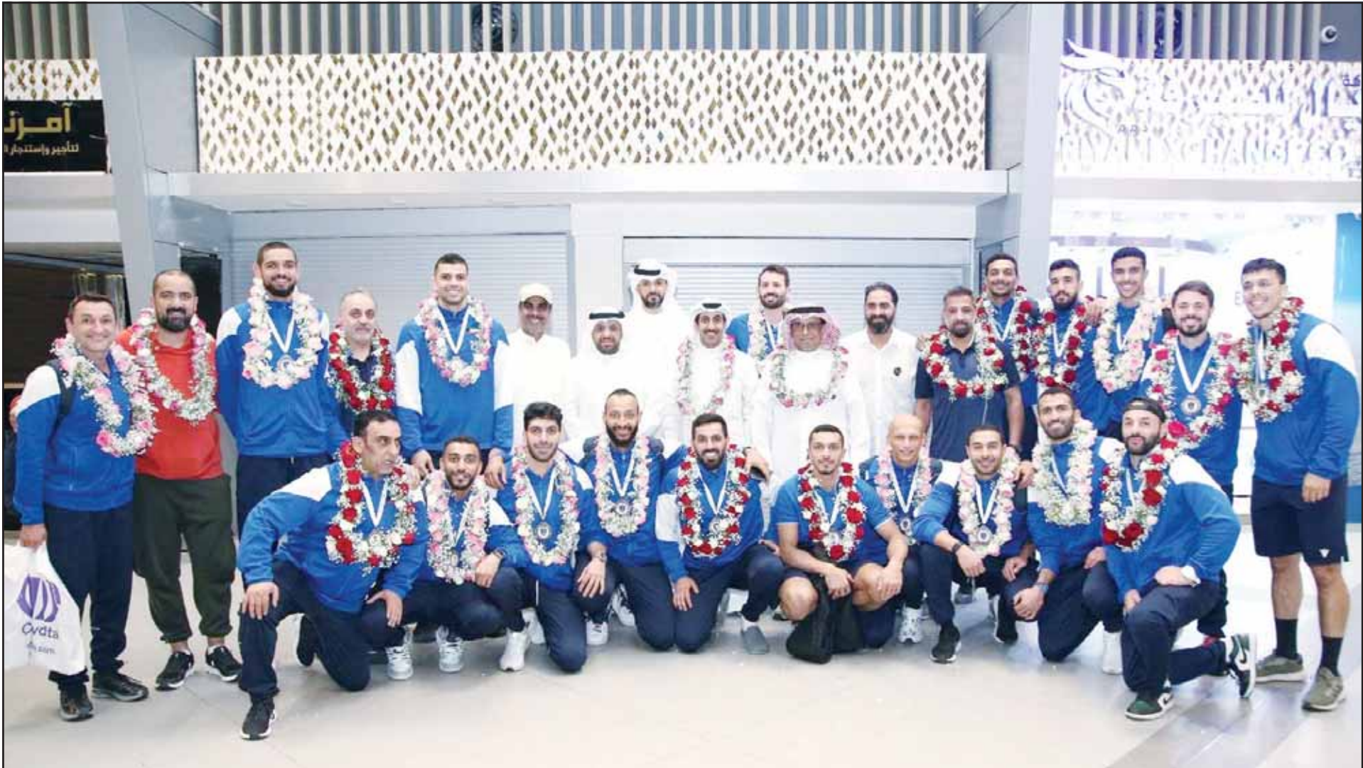
The players honored upon their return.