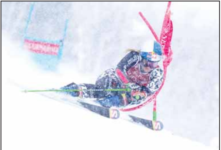
Alice Robinson of New Zealand speeds down the course as she races in the women's World Cup giant slalom in Mont Tremblant, Que.