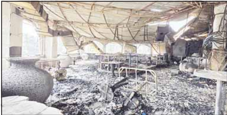
The charred interiors of a club, which caught fire early Sunday, are seen in Arpora, Goa, India on Dec 7.