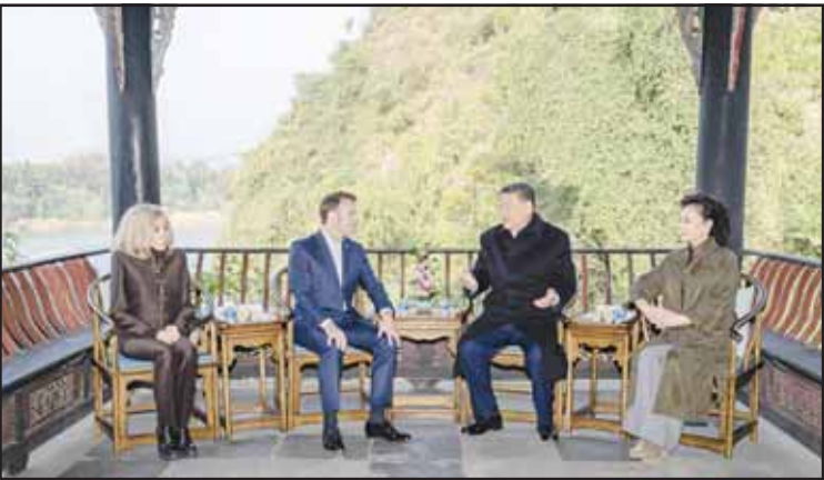
Chinese President Xi Jinping and his wife Peng Liyuan, together with French President Emmanuel Macron and his wife Brigitte Macron, take seats at Huaigu Pavilion, where they enjoy tea by the waterside and hold wide-ranging discussions on global affairs, in Duijiangyan of Chengdu, southwest China's Sichuan Province on Dec 5.

In another X post published on Friday, he thanked China for this "inspiring visit and this warm, friendly welcome," highlighting the "powerful moment" spent in southwest China's Sichuan Province. Macron praised Duijiangyan in Sichuan's capital city Chengdu as a "two-thousand-year-old marvel that tames water and irrigates Sichuan." He said the ancient irrigation project embodies the same "harmony between human ingenuity and nature" and the "care for the mountains and water that bring life" as found in southwestern France's Hautes-Pyrenees Department. Macron concluded his fourth state visit to China on Friday, after stops in