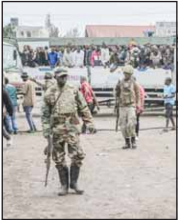
M23 rebels escort government soldiers and police who surrendered to an undisclosed location in Goma, Democratic Republic of the Congo on Jan 30.