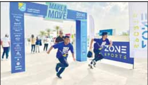
Students and staff embrace wellness at KU's 'Make a Move' sports event.

KUWAIT CITY, Dec 7: Kuwait University's Security and Safety Department, in collaboration with the Public Authority for Sports (PAS) and the Public Authority for Youth (PAY), organized a health and sports event titled "Make a Move" on Wednesday, December 3, from 9:00 am to 5:00 pm at the Sabah Al-Salem University City campus.