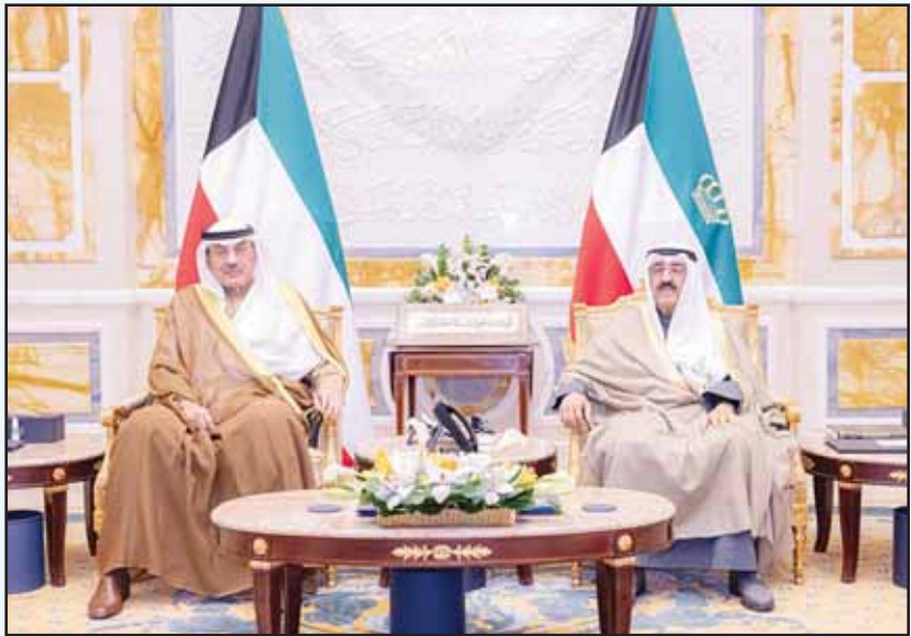
His Highness the Amir Sheikh Meshal Al-Ahmad Al-Jaber Al-Sabah received His Highness the Crown Prince Sheikh Sabah Khaled Al-Hamad Al-Sabah at Bayan Palace on Sunday.