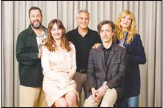
Cast member Adam Sandler, from left, co-writer Emily Mortimer, cast member George Clooney, director/co-writer Noah Baumbach and cast member Laura Dern pose for a portrait to promote the film ‘Jay Kelly’ in Los Angeles.

“Jay Kelly,” which Baumbach wrote with Emily Mortimer, wasn’t just a clever character study but a lovingly clear-eyed portrait of the strange business of Hollywood moviemaking