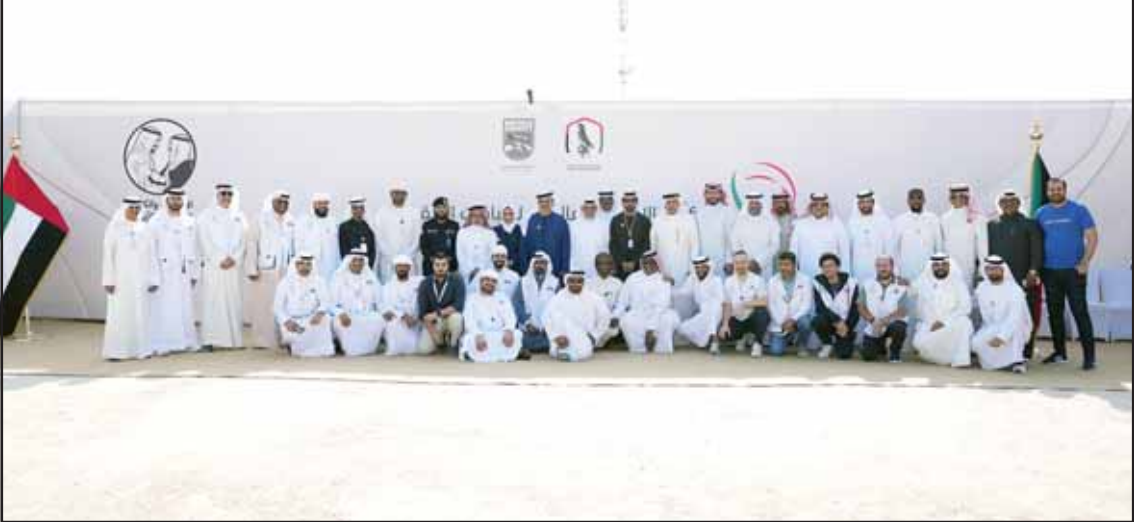
Participants pose for a group photo.