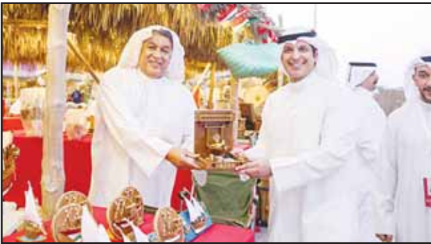
Kuwait Information Minister, Abdulrahman Al-Mutairi visits Kuwaiti pavilions displaying in Qatar.

Kuwait's Minister of Information, Culture, Minister of State for Youth Affairs Abdulrahman Al-Mutairi on Saturday visited Kuwaiti pavilions and exhibitions showcasing at Qatar's tourist and entertainment destinations The minister toured the tourist destinations, Darb Lusail and Katara Cultural Village. He proceeded to the sites after attending the Kuwait-Jordan football match held as part of the 2025 Fifa Qatar Arab Cup tournament. Al-Mutairi in remarks during the visits expressed satisfaction at the eye-catching Kuwaiti participation with diverse