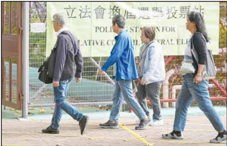
Citizens arrive at a polling station in Tai Po of Hong Kong, south China on Dec 7.

HONG KONG, Dec 7, Voting for the election of the eighth-term Legislative Council (LegCo) of China's Hong Kong Special Administrative Region (HKSAR) kicked off Sunday morning. Long queues had already formed outside multiple polling stations across Hong Kong before the polls opened at 7:30 am local time. At polling station entrances, staff and volunteers attentively assisted voters with the procedures. HKSAR Chief Executive John Lee cast his ballot around 8:30 a.m. at Raimondi College on Robinson Road. Speaking to the media, Lee hoped that all voters would come out to vote, noting that each ballot represents a push for reform and a collective effort to move forward together. The new term of LegCo will be composed of 90 members, including 40 elected by the Election Committee, 30 elected by functional constituencies, and 20 elected by geographical constituencies through direct elections. A total of 161 candidates are contesting the election, with competition for every seat. Also: HONG KONG: The Office for Safe