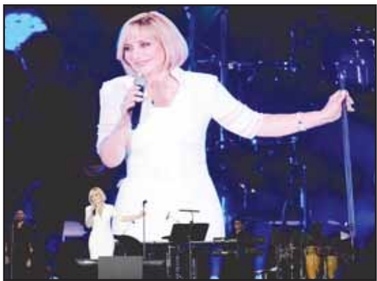
In this file photo, Iranian pop star Googoosh performs during a concert at the Dubai Expo 2020, in Dubai, United Arab Emirates.

But meanwhile, Iran’s economy continues to strain under international sanctions over its nuclear program. Its theocracy continues to execute people in the wake of the