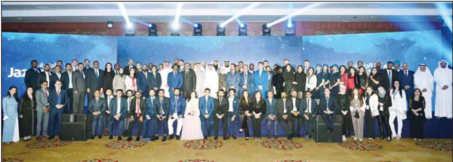
Jazeera Team Members