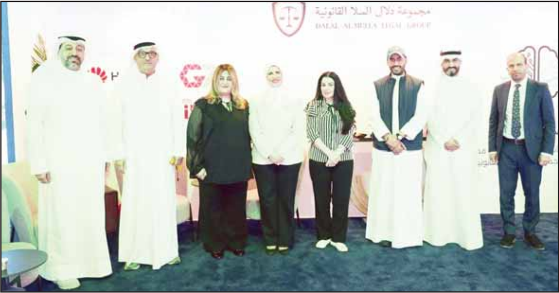
Photos during Dalal Al Mulla Legal Group launching of its 'Musaed' Smart Platform at NEXUS Exhibition.