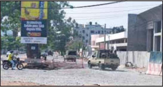
Soldiers ride in a military vehicle along a street amid an attempted coup in Cotonou, Benin on Dec 6.