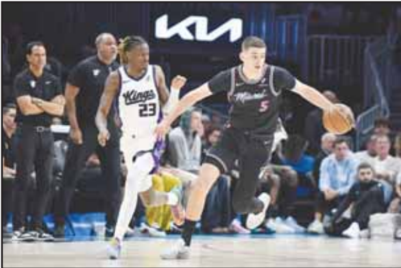
Miami Heat forward Nikola Jović (5) dribbles ahead of Sacramento Kings guard Keon Ellis (23) during the second half of an NBA basketball game in Miami.

Daniels then made two free throws with 4.8 seconds left and the Timberwolves held on. Minnesota won its season-high fifth straight game. The Clippers have lost seven of eight. James Harden led the Clippers with 34 points and moved into 10th on the NBA's career scoring list. He surpassed Carmelo Anthony (28,289 points) with a pair of free throws in the third quarter. Kawhi Leonard added 20 points while Ivica Zubac had 15 points and 13 rebounds for the Clippers. Harden missed a potential tying 3-pointer at the buzzer. Mavericks 122, Rockets 109 In Dallas, Anthony Davis scored 29 points and Dallas beat Houston to finish a back-to-back coming off a blowout loss at defending champion Oklahoma City. Davis went 14 of 19 from the field a night after making just one of nine shots and scoring two points in 24 minutes in a 132-111 loss to the Thunder. It was fewest points of the 10-time All-Star's career when playing at least 20 minutes. Kevin Durant scored 20 of his 27 points in the first half but ended up not playing in the fourth quarter after the Mavericks outscored Houston 37-20 in the third and took a 21-point lead early in the fourth. The game was tied at halftime. Cooper Flagg had 19 points, and one of his three assists came on a nifty transition bounce pass to Ryan Nembhard for a 98-77 lead. Brandon Williams scored 20 points as the backup point guard to Nembhard, the rookie who had 11 points and seven assists in his sixth consecutive start, the first of his career.