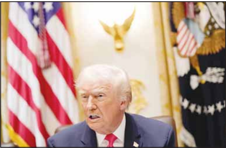
US President Donald Trump speaks during a Cabinet meeting at the White House on Dec 2 in Washington.

of the executive branch answer to the president, and that includes the ability to fire their leaders at will. As Justice Antonin Scalia wrote in a 1988 dissent that has taken on mythical status among conservatives, “this does not mean some of the executive power, but all of the executive power.” Since 2010 and under Roberts’ leadership, the Supreme Court has steadily whittled away at laws restricting the president’s ability to fire people. In 2020, Roberts wrote for the court that “the President’s removal power is the