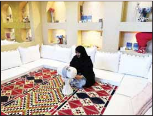
Left to Right photos from the Museum.