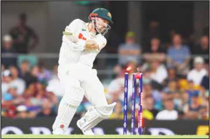
Australia's Travis Head bowled out by England's Gus Atkinson during the second Ashes cricket test match between Australia and England in Brisbane.

With Australia at 63-2 and needing just two runs to win the day-nighter, Smith hit a six to seal it and finished unbeaten on 23 from nine deliveries.