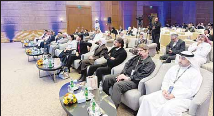
Part of the audience.