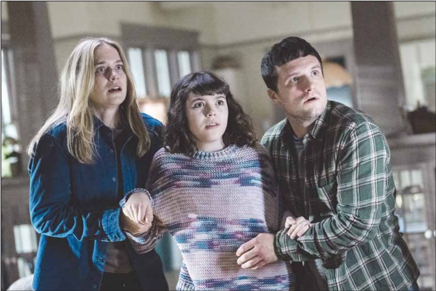
This image released by Universal Pictures shows Elizabeth Lail, from left, Piper Rubio, and Josh Hutcherson in a scene from ‘Five Nights at Freddy’s 2.’