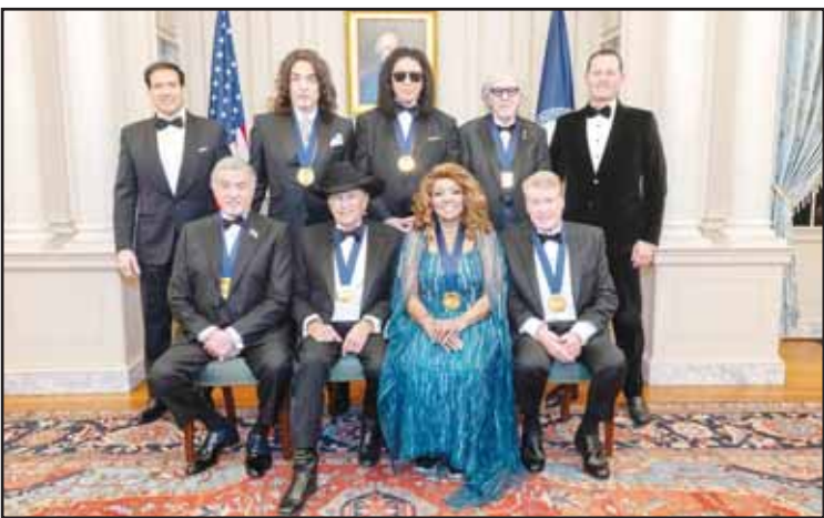
Secretary of State Marco Rubio, left, and President of the Kennedy Center Board of Trustees Richard Grenell, right, join the 2025 Kennedy Center Honorees, front row from left, Sylvester Stallone, George Strait, Gloria Gaynor and Michael Crawford, members of the rock band KISS, Paul Stanley, center right, Gene Simmons and Peter Criss, center left, for a group photo at the 48th Kennedy Center Honors Medallion Reception, hosted at the U.S. Department of State in Washington.

Previous honorees have come from a broad range of art forms, whether dance (Martha Graham, Merce Cunningham), theater (Stephen Sondheim,