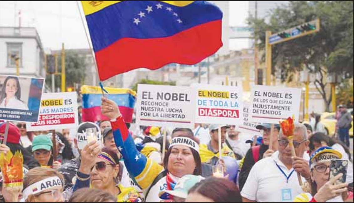
Venezuelan opposition supporters demonstrate ahead of the Nobel Peace Prize ceremony where Venezuelan Maria Corina Machado is among this year's laureates, in Lima, Peru on Dec 6.

based Sichuan University on Friday. Macron noted that humanity is experiencing a profound transition in habits, lifestyles, and landscapes. He emphasized the necessity of not only cooperating but also fostering mutual understanding, getting to know one another, and engaging in collective reflection to develop practical solutions for pressing issues like the climate crisis.