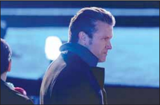
US Defense Secretary Pete Hegseth arrives before the lighting of the National Christmas Tree on the Ellipse on Dec 4, near the White House in Washington.

basis as China and Russia - a goal that has alarmed many nuclear arms experts. China and Russia haven’t conducted explosive tests in decades, though the Kremlin said it would follow the U.S. if Trump restarted tests. The speech was delivered at the Reagan National Defense Forum at the Ronald Reagan Presidential Foundation and Institute in California, an event which brings together top national security experts from around the country. Hegseth used the visit to argue that Trump is Reagan’s “true and rightful heir” when it comes to muscular foreign policy. By contrast, Hegseth criticized Republican leaders in the years since Reagan for supporting wars in the Middle East and democracy-building efforts that didn’t work. He also blasted those who have argued that climate change poses serious challenges to military readiness.