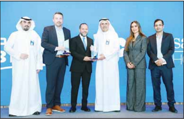
Part of the honoring ceremony for Al Manzel Program partners.