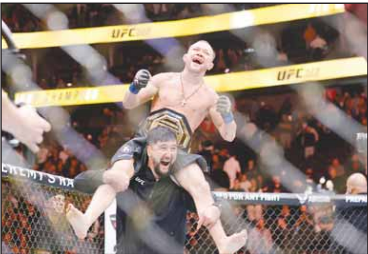
Petr Yan celebrates with a member of his team after defeating UFC bantamweight champion Merab Dvalishvili during UFC in Las Vegas.

LAS VEGAS, Dec 7, Petr Yan stunned Merab Dvalishvili with a dominating effort to capture the bantamweight championship by unanimous decision at UFC 323. With punishing strikes and several crushing kicks to the rib cage, Yan (20-5) ended Dvalishvili's 14-match winning streak. "I'm very happy to stand here with the championship belt, thank you to all the fans," Yan said, through an interpreter. "I worked so hard, I prepared so hard for this moment." Dvalishvili (21-5) hadn't lost since April 21, 2018, when Ricky Simon won by submission. It was his fourth title match of 2025. Yan exacted revenge for his last loss when Dvalishvili defeated the 32-year-old by unanimous decision on a UFC Fight Night card on March 11, 2023. Dvalishvili, 34, closed a -425 favorite, which meant a better laid $425 to $100 at BetMGM. Anyone wagering $100 on Yan would have won $320. "I lost today," Dvalishvili said. "Congratulations to him." In the co-main event, challenger Joshua Van won the flyweight belt from former champion Alexandre Pantoja with a TKO just 26 seconds into the first round after a quirky finish. In what appeared to be a freak accident, Pantoja (30-6) injured his left shoulder just after throwing a right roundkick to Van's head. But as Van (16-2) blocked the kick, Pantoja used his left arm to brace his fall, but his arm buckled, and he