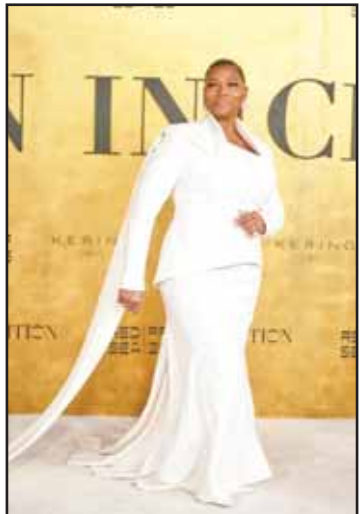
Queen Latifah arrives to attend a session celebrating women in cinema during the Red Sea International Film Festival in Jeddah, Saudi Arabia.

hosting this major artistic event, and underscored the importance of the cultural partnership between Kuwait and China. Hosting this exhibition is a key step to strengthening cultural collaboration between Kuwait and China, he noted. He pointed out that the museum and the Chinese audience are interested in getting informed about Mughal and Islamic heritage through one of the most outstanding artistic groups across the world. The exhibition brings together a selection of masterpieces from the Al-Sabah Archaeological Collection that reflect the grandeur of the Mughal court and the arts of India across four centuries. The showcased pieces include daggers and weapons decorated with precious stones such as emeralds, rubies, and diamonds, most notably a 17th-century katar dagger, as well as crystal vessels and artifacts adorned with intricate floral motifs showing the skill of artisans in the royal workshops. Also, royal jewelry is showcased that highlights the opulence and sophistication that characterized the Mughal court and others.