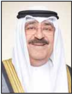
HH the Amir