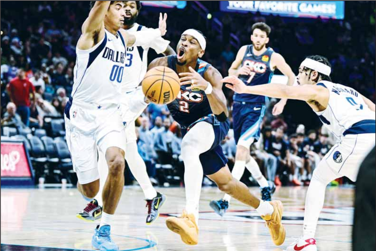
Oklahoma City Thunder guard Shai Gilgeous-Alexander (2) drives against Dallas Mavericks guard Max Christie (00) during the second half of an NBA basketball game in Oklahoma City.