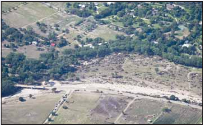
Damage is seen on July 8, 2025, near Hunt, Texas, after a flash flood swept through the area. (AP)

KERRVILLE, Texas, Dec 6, (AP): Many of the voices were frantic and desperate. A few were steady and calm amid mounting, frightening danger, and in some cases, inescapable doom. They came from families huddled on rooftops to escape rising, swirling waters, mothers panicked for the wellbeing of their children and onlookers who heard people yell for help through the dark as they clung to treetops. One man, stuck high in a tree as it began to break under the pressure of the floodwaters, asked emergency dispatchers for a helicopter rescue that never came. Their pleas were among more than 400 calls for help across Kerr County last summer when devastating floods hit during the overnight hours on the July Fourth holiday. The recordings of the 911 calls were released Friday. The sheer volume of calls would overwhelm two county emergency dispatchers on duty in the Texas Hill Country as catastrophic flooding inundated cabins and youth camps along the Guadalupe River.