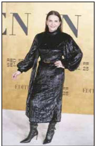
Juliette Binoche arrives to attend a session celebrating women in cinema during the Red Sea International Film Festival in Jeddah, Saudi Arabia. (AP)

JEDDAH, Saudi Arabia, Dec 6, (AP): The fifth edition of the Red Sea International Film Festival, one of the Middle East’s largest film festivals, opened in the coastal city of Jeddah, marking a significant moment for the kingdom’s growing film industry. Running from Dec. 4 to 13, the Red Sea International Film Festival brings together filmmakers and talent from around the world, screening more than 100 films from over 70 countries.