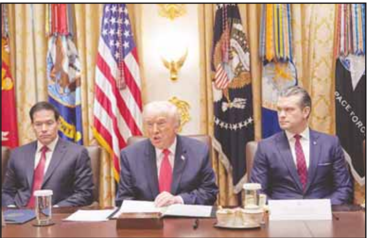
US President Donald Trump speaks during a Cabinet meeting at the White House on Dec 2 in Washington, as Secretary of State Marco Rubio, (left), and Defense Secretary Pete Hegseth, (right), look on.

WASHINGTON, Dec 6, US President Donald Trump’s administration has set forth a new national security strategy that paints European allies as weak and aims to reassert America’s dominance in the Western Hemisphere. The document released Friday by the White House is sure to roil long-standing US allies in Europe for its scathing critiques of their migration and free speech policies, suggesting they face the “prospect of civilizational erasure” and raising doubts about their long-term reliability as American partners. At the same time the administration is sharply critical of its democratic allies in Europe and carrying out a pressure campaign of boat strikes in South America, it chides past US efforts to shape or criticize Middle Eastern nations and seeks to discourage attempts for changes in those countries’ governments and policies. The strategy reinforces, in sometimes chilly and bellicose terms, Trump’s “America First” philosophy, which favors nonintervention overseas, questions decades of strategic relationships and prioritizes US interests.