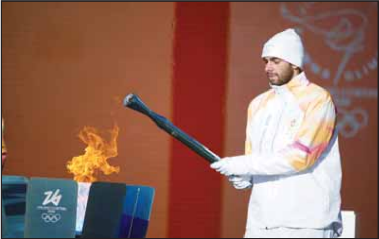
Italian swimmer Gregorio Paltrinieri lights the 2026 Milan Cortina Winter Olympics torch in Rome as it begins its journey through Italy, a journey that will conclude in Milan in February 2026. Paltrinieri handed off to retired fencer Elisa Di Francisca, who won two golds at the 2012 London Games. Up next was Gianmarco Tamberi, the 2020 Olympic high jump cham

pion. Also due to carry the torch around Rome on Saturday were tennis player Matteo Berrettini, retired NBA player Andrea Bargnani and former motor-cycle racer Max Biaggi. The torch relay, which includes 60 city celebrations, will be in Naples for Christmas and in Bari for New Year's Eve. It will reach 2006 Olympics host Turin on Jan 11. The torch will arrive in Verona on Jan. 18 and pass through Cortina d'Ampezzo on Jan. 26 - on the 70th anniversary of the opening ceremony of the 1956 Winter Olympics held at the resort in the Dolomites. There will also be a cauldron lit in Cortina on the night of the opening ceremony. Local organizing committee president Giovanni Malagò noted that the torch relay will pass by all of the country's UNESCO World Heritage sites, of which Italy has more than any other country with 61. "It's like a giant two-month advertisement," Malagò said. These games will be held across a large swath of northern Italy and the ceremony will be observed in four different locations, including Livigno (where snowboarding and freestyle skiing will be contested) and Predazzo (ski jumping). Skating sports will be held in Milan; men's Alpine skiing and ski mountaineering in Bormio; and women's Alpine skiing, sliding sports and curling in Cortina. The next stops on the torch relay are Viterbo on Sunday and Terni on Monday.