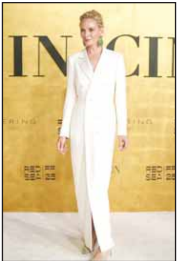
Uma Thurman arrives to attend a session celebrating women in cinema during the Red Sea International Film Festival in Jeddah, Saudi Arabia.

kingdom’s Public Investment Fund sovereign wealth fund and private sponsors. It aims to play a vital role in promoting regional filmmakers and fostering global connections. The festival is part of Saudi Arabia’s Vision 2030 objectives, which include diversifying the economy, strengthening cultural infrastructure and fostering local creative talent.