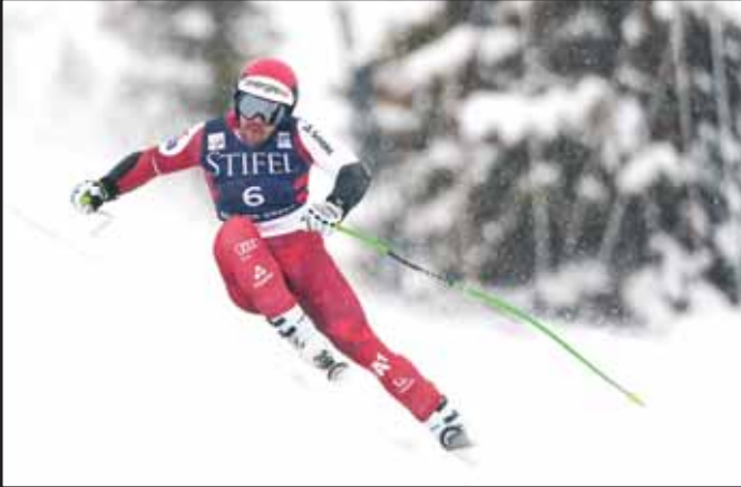
Austria's Vincent Kriechmayr competes during a World Cup men's super-G skiing race in Beaver Creek, Colo.