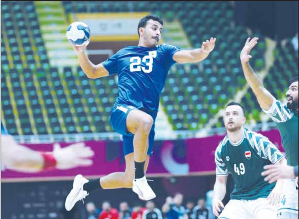
A Kuwait handball player fires a shot at goal.