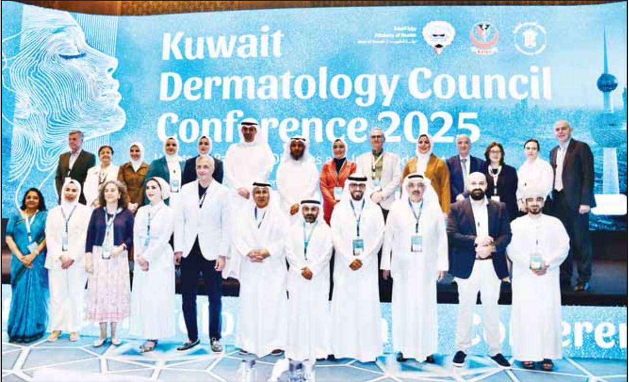
Delegates and speakers pose at the Kuwait Dermatology Council Conference 2025, highlighting rare and chronic skin diseases and showcasing international collaboration in dermatology.

al staff. This year’s conference reinforces the ministry’s vision of developing diagnostic and treatment pathways and expanding opportunities for scientific collaboration with regional and international centers. The conference provides a platform for exchanging expertise among international experts from the United Kingdom, France, Germany, Spain, Egypt, India, and the Sultanate of Oman, along with Kuwaiti physicians working in the field. This year’s scientific program includes advanced sessions and specialized panel discussions addressing the latest developments in dermatology and exploring clinical challenges with evidence-based treatment options.” Dr. Al-Lafi praised the efforts of the orga-