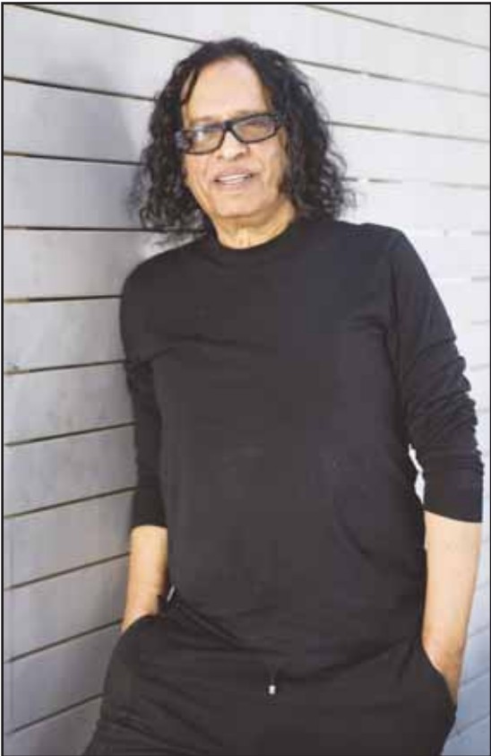
Izhar Cohen, an Israeli singer who won the 1978 Eurovision song contest poses for a photo in Tel Aviv, Israel.

The boycotts are a financial blow to Eurovision, which is funded largely by participating broadcasters, and to public broadcasters at a time when many are under financial pressure from government funding cuts and competition from social media.