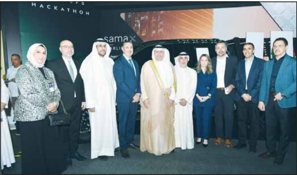
Minister Omar Al-Omar with Sama X team.