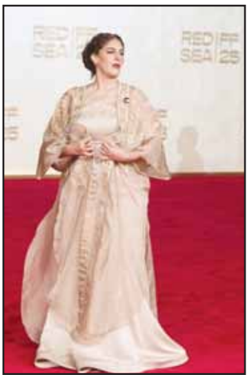
Annemarie Jacir arrives on the occasion of the presentation of movie Palestine 36, during the Red Sea International Film Festival in Jeddah, Saudi Arabia.

The event comes as Saudi Arabia invests heavily in sectors like film, gaming and sports as part of its broader transformation efforts. However, various rights groups have criticized these actions, saying they serve to draw away attention from the kingdom’s human rights record, including its high rate of executions and restrictions on free expression.