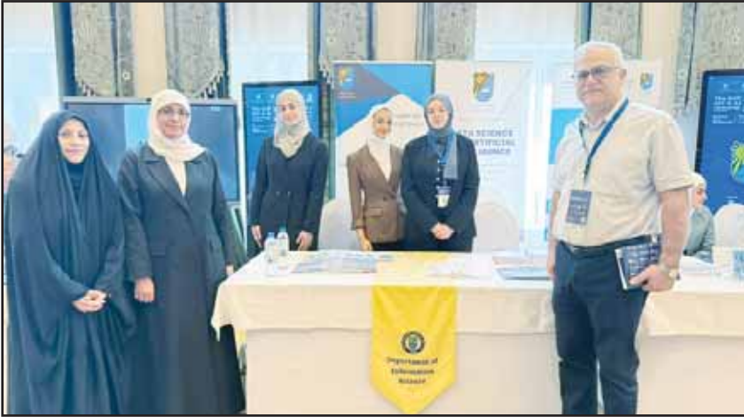
Kuwait University photo

Al-Enezi revealed that the contract is valued at KD 20,619,380 and is scheduled to be completed within 900 days.