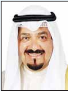
HH the Prime Minister