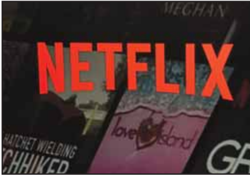
The Netflix logo is shown in this photo from the company's website in New York.

But either way, he said, customers could see some price relief in the form of a single subscription bill or bundle promotions, which would be a welcome change as streaming prices continue to rise and consumers feel