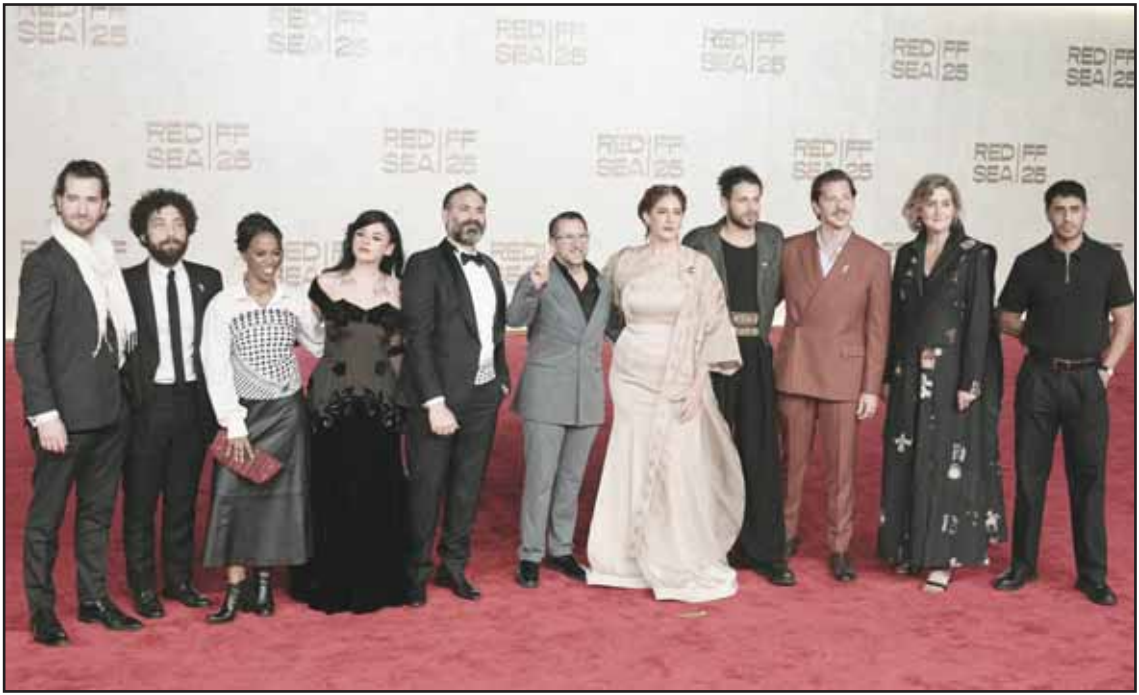
Stars of movie Palestine 36, pose with the film director Annemarie Jacir, 5th right, during the Red Sea International Film Festival in Jeddah, Saudi Arabia.