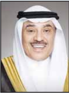
HH the Crown Prince