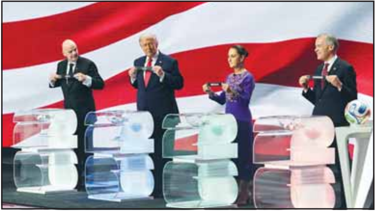
Canadian Prime Minister Mark Carney, Mexican President Claudia Sheinbaum, President Donald Trump and FIFA President Gianni Infantino hold up country names during the draw for the 2026 soccer World Cup at the Kennedy Center in Washington.

"We know them but they know us," U.S. coach Mauricio Pochettino said.