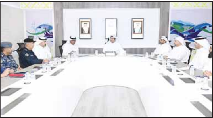
Ministry of Information photo Minister of Information and Culture and Minister of State for Youth Affairs Abdulrahman Al-Mutairi during the meeting.

mer experience in organizing sports activities, it added. He further affirmed the necessity of integrating all efforts of the committees to achieve the goals to present an honorable example showing Kuwait's status, it noted. The minister expressed appreciation to all government and private sector bodies as well as civil society organizations for their cooperation and supportive efforts to the success of major national events. Meanwhile, the heads of committees reviewed the key projects and acts related to the duties of every committee to make sure of all preparations and ensure full readiness to fulfill duties.