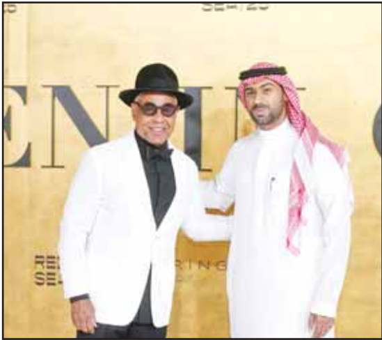
Faisal Baltyuor, right, CEO of the Red Sea International Film Festival, greets Giancarlo Esposito as he arrives to attend a session celebrating women in cinema during the Red Sea International Film Festival, in Jeddah, Saudi Arabia.