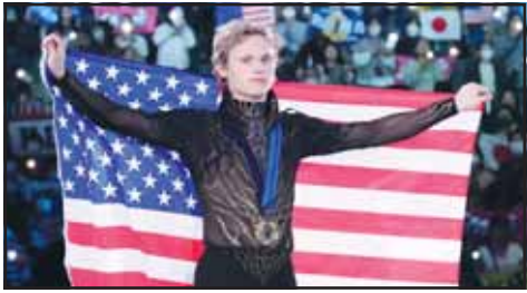
Ilia Malinin, of the United States, poses after winning the gold medal in the men's event at the ISU Grand Prix of Figure Skating Final in Nagoya, central Japan.