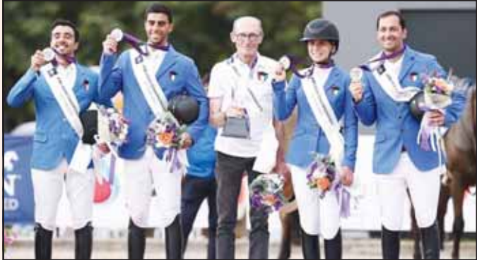
Kuwaitis display their silver medals.

BANGKOK, Dec 6, (KUNA): Kuwait's equestrian team claimed second place and the silver medal on Friday at the Asian Show Jumping Championship, which began two days ago in Thailand and will continue until next Sunday.