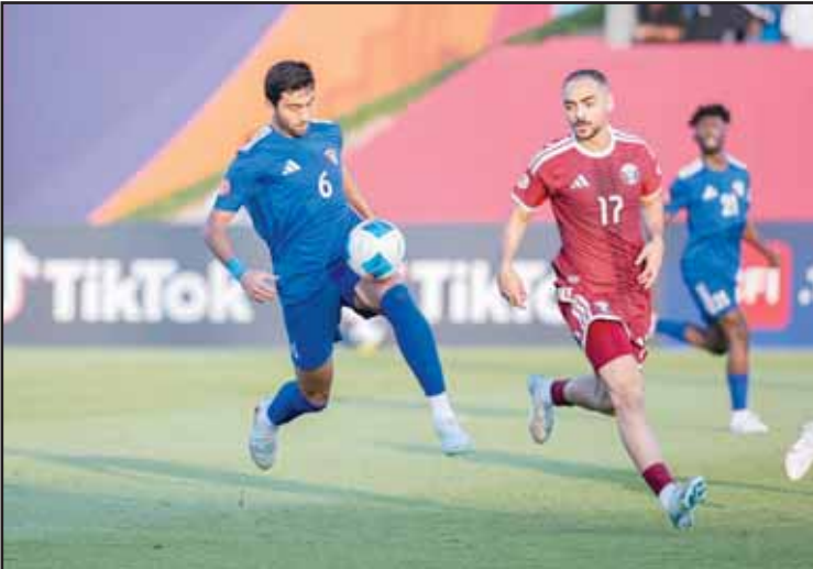
Kuwait U-23 player controls the ball during the match against Qatar.