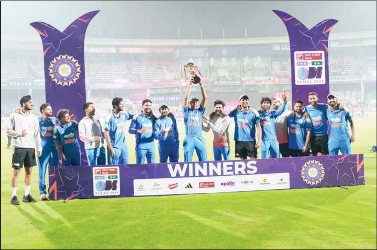
Indian players pose with the trophy after winning the third One Day International cricket match against South Africa in Visakhapatnam, India.