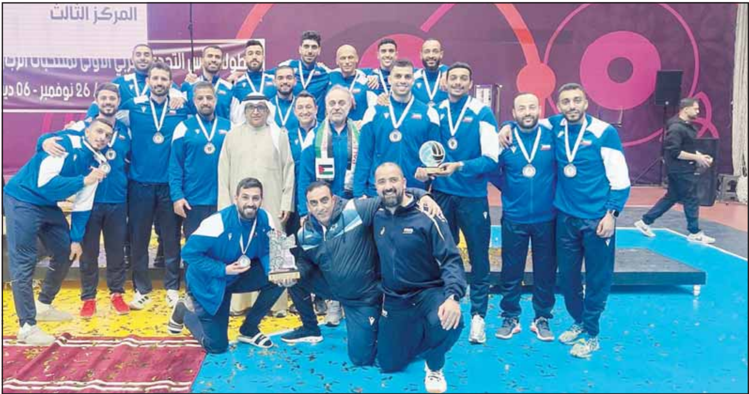
Kuwait players celebrate on the podium after winning bronze in the inaugural Arab Challenge Cup.