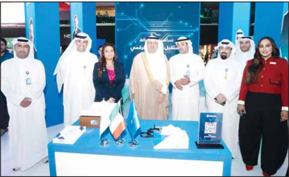
H.E. the Minister visiting Burgan Bank’s booth.