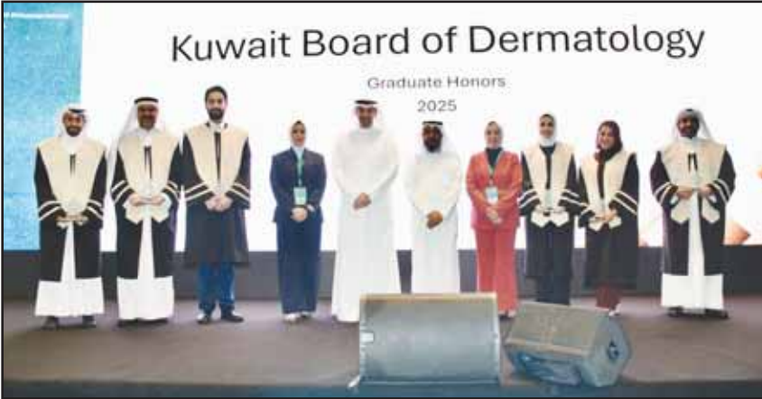
2025 Kuwaiti Board of Dermatology graduates being honored.