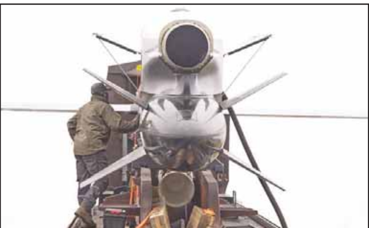
Workers and military inspect Ukrainian Fire Point’s Flamingo missiles during handover to the military in an undisclosed location in Ukraine on Dec 4. (AP)

KYIV, Ukraine, Dec 6, (AP): Russia unleashed a major missile and drone barrage on Ukraine overnight into Saturday, after U.S. and Ukrainian officials said they’ll meet on Saturday for a third day of talks aimed at ending the nearly 4-year-old war. Following talks that made progress on a security framework for postwar Ukraine, the two sides also offered the sober assessment that any “real progress toward any agreement” ultimately will depend “on Russia’s readiness to show serious commitment to long-term peace.” The statement from US special envoy Steve Witkoff, Trump’s son-in-law Jared Kushner as well as Ukrainian negotiators Rustem Umerov and Andriy Hnatov came after they met for a second day in Florida on Friday. They offered only broad brushstrokes about the progress they say has been made as Trump pushes Kyiv and Moscow to agree to a US-mediated proposal to end the war. Russia used 653 drones and 51 mis-