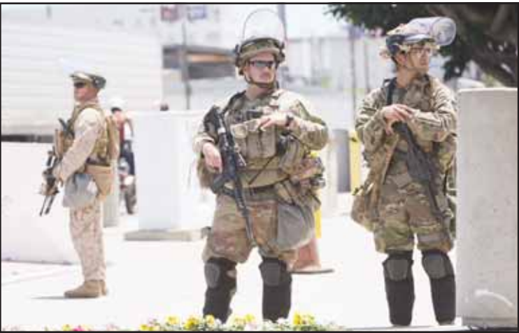
Members of the California National Guard and U.S. Marines guard a federal building on June 17, in Los Angeles.

SAN FRANCISCO, Dec 6, A federal judge on Friday sharply questioned the Trump administration’s authority and need to maintain command of California National Guard troops it first deployed to Los Angeles in June following violent protests. At a hearing in San Francisco, US District Judge Charles Breyer suggested conditions in Los Angeles had changed since the initial deployment, and he questioned whether the administration could control state Guard troops “forever” under its interpretation of federal law. “No crisis lasts forever,” he said. “I think experience teaches us that crises come and crises go. That’s the way it works.” He pressed an attorney for the government for any evidence that state authorities were either unable or unwilling to help keep federal personnel and property in the area safe and noted President Donald Trump had access to tens of thousands of active duty troops in California. California officials have asked Breyer to issue a preliminary injunction returning control of remaining California National Guard troops in Los Angeles to the state. Breyer did not immediately rule. He has previously found