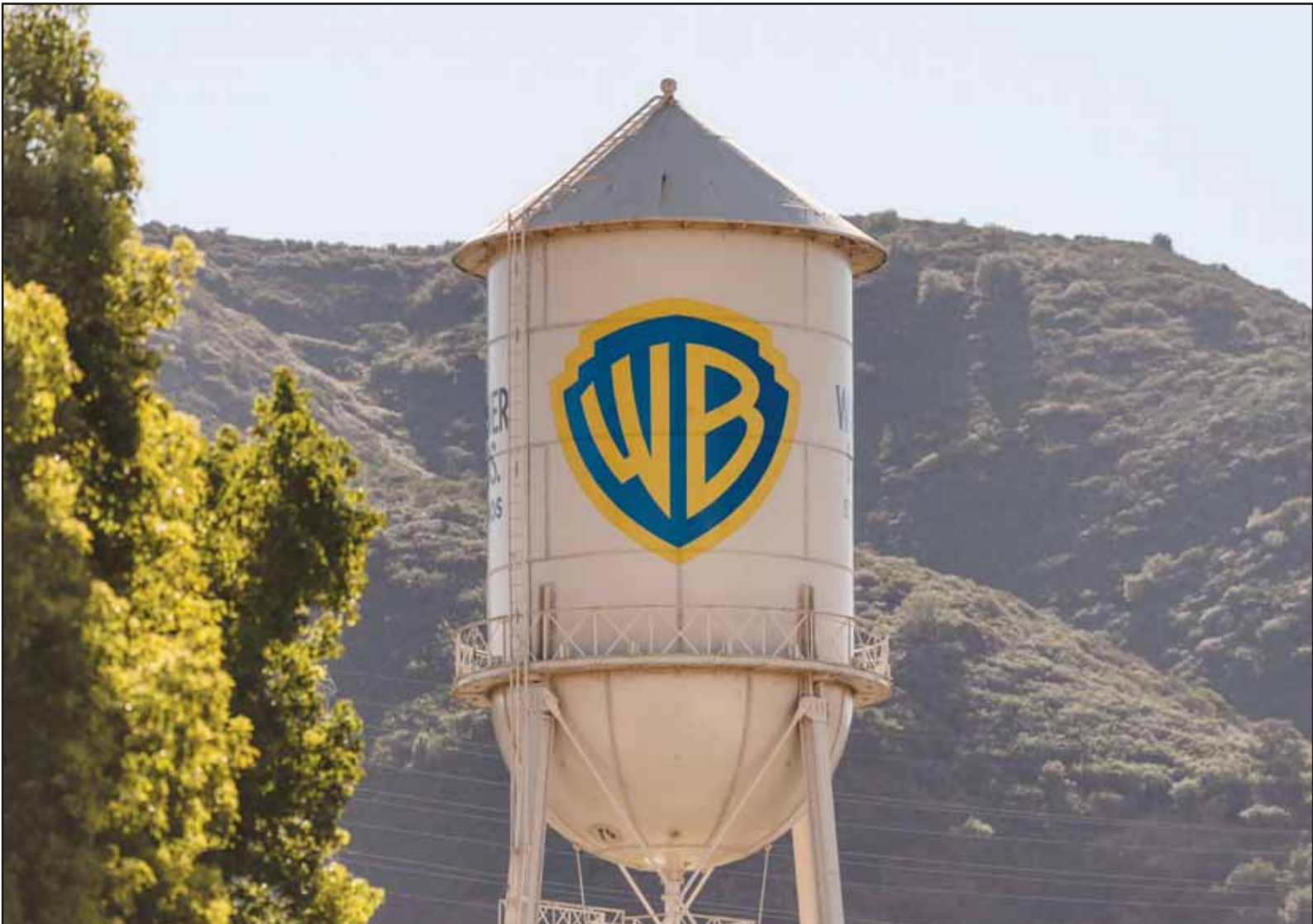
The Warner Bros. water tower is seen at Warner Bros. Studios in Burbank, Calif.