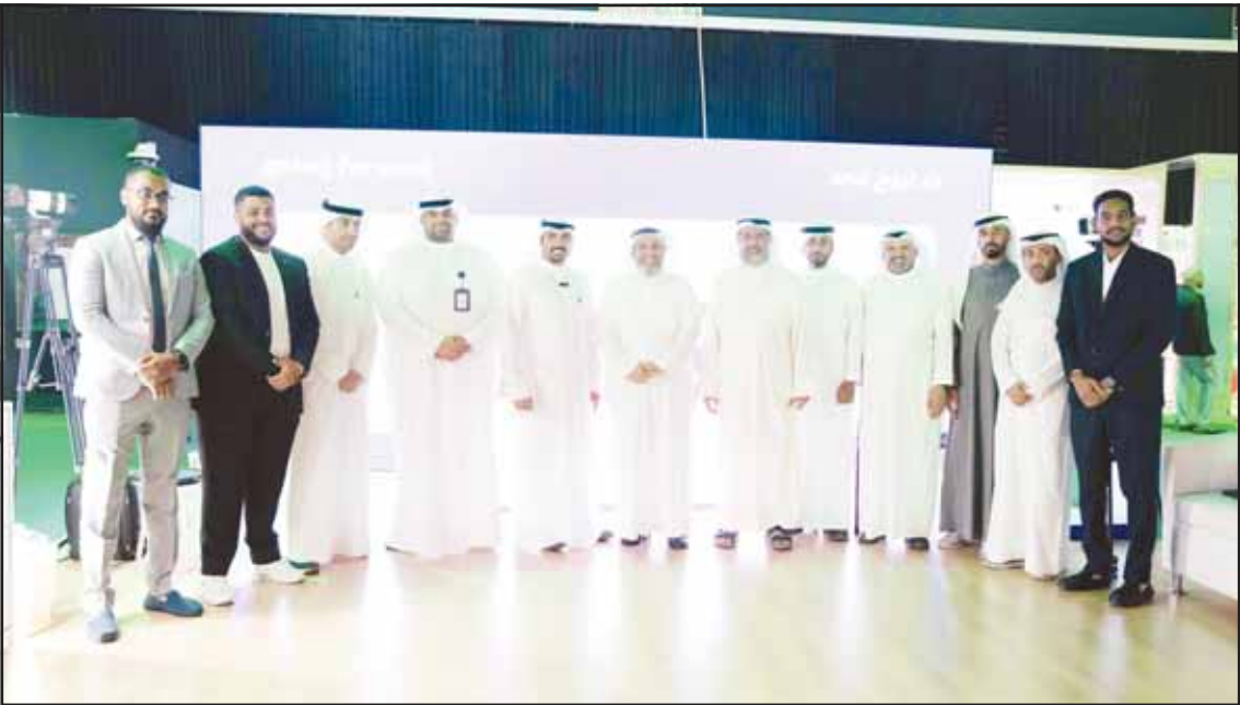
stc signs MoUs to strengthen digital partnerships.

As a platinum sponsor, stc and its subsidiaries hosted a series of interactive workshops at its booth covering various technological concepts and innovations. The Company also announced the signing of several Memorandums of Understanding (MoUs) with leading companies and applications, demonstrating its continued commitment to building strong partnerships that support business growth and digital enablement. Additionally, stc participated in