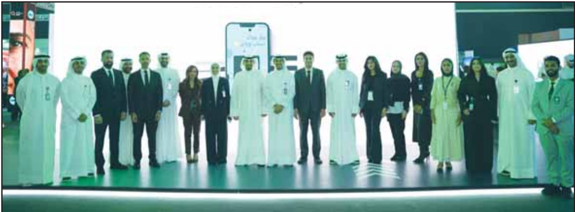
Group photos during the exhibition.