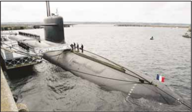
In this July 13, 2007 file photo, French Marine officers wait atop ‘Le Vigilant’ nuclear submarine at L’Île Longue military base, near Brest, Brittany.

or headline.” Democrats, who have had leadership criticisms of their own, have revealed in the GOP’s disarray. House Republican leaders attempted to muscle through an NCAA-backed bill to regulate college sports after the White House endorsed it, before support within Republican ranks crumbled. Some GOP lawmakers pointedly said they had bigger priorities before the end of the year. “It’s not that Congress can’t legislate, it’s House Republicans that can’t legislate. It’s the gang that can’t legislate straight. They continue to take the ‘my way or the highway’ approach,” said House Democratic Leader Hakeem Jeffries. All eyes in the US House were on a special election Tuesday night in a Tennessee district that a Republican had won in 2024 by nearly 21 percentage points, with Trump carrying the area by a similar margin. Republicans hoped the contest would help them regain momentum after losing several marquee races across the country in November. Democrats, meanwhile, argued that keeping the race close would signal strong political winds at their backs ahead of next year’s midterms, which will determine control of both chambers. Republican Matt Van Epps ultimately won by nearly 9 percentage points.