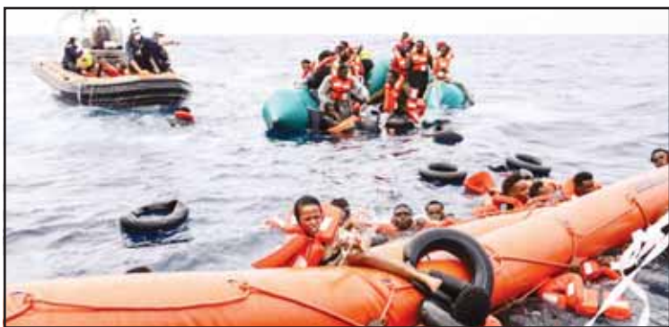
Migrants who fell in the water struggle to cling on to a float before being rescued by humanitarian rescuers, around 35 miles away from Libya, in the Mediterranean Sea, on Oct 18, 2021.