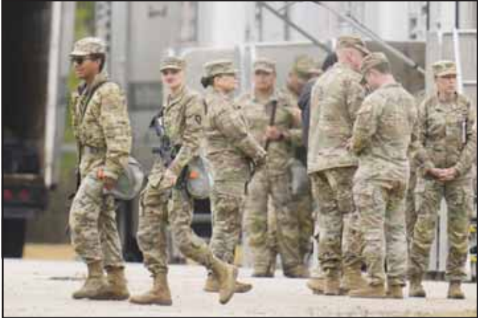
Military personnel in uniform, with the Texas National Guard patch on, are seen at the US Army Reserve Center on Oct 7, in Elwood, Ill., a suburb of Chicago. (AP)

WASHINGTON, Oct 18, (AP): The Trump administration on Friday asked the Supreme Court to allow the deployment of National Guard troops in the Chicago area, escalating President Donald Trump's conflict with Democratic governors over using the military on US soil. The emergency appeal to the high court came after a judge prevented, for at least two weeks, the deployment of Guard members from Illinois and Texas to assist immigration enforcement. A federal appeals court refused to put the judge's order on hold. The conservative-dominated court has handed Trump repeated victories in emergency appeals since he took office in January, after lower courts have ruled against him and often over the objection of the three liberal justices. The court has allowed Trump to ban transgender people from the military, claw back billions of dollars of congressionally approved federal spending, move aggressively against immigrants and fire the Senate-confirmed leaders of independent federal agencies. In the dispute over the Guard, U.S. District Judge April Perry said she found no substantial evidence that a "danger of rebellion" is brewing in Illinois during Trump's immigration crackdown.