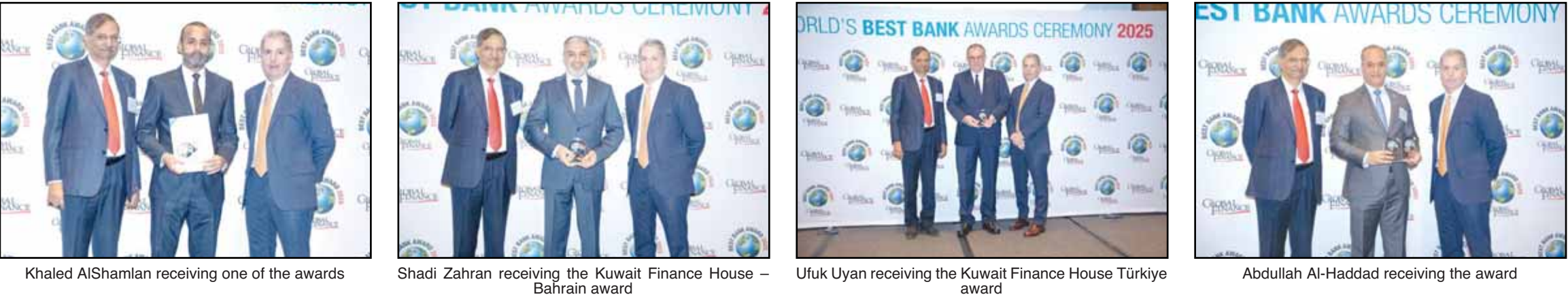
Bank wins 9 awards from Global Finance magazine