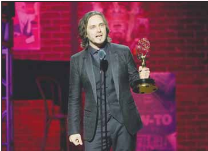
Actor Jonathan Jackson speaks onstage after winning Outstanding Supporting Actor in a Daytime Drama Series for his performance in 'General Hospital.'