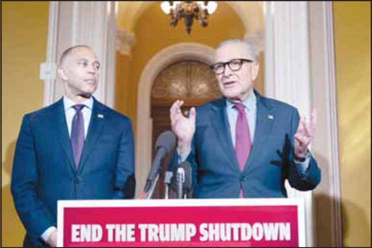
House Minority Leader Hakeem Jeffries (left), and Senate Minority Leader Chuck Schumer, speak to reporters outside the Senate chamber as they charge President Donald Trump and the Republicans with the government shutdown, at the Capitol in Washington on Oct 16.

tors - will see large increases when premium prices go out in the coming weeks. Looking ahead to a Nov. 1 deadline in most states, they think voters will demand that Republicans enter into serious negotiations. "The ACA crisis is looming over everyone's head, and yet Republicans seem ready to let people's premiums spike," said Senate Democratic leader Chuck Schumer in a floor speech. Meanwhile, Thune tried a different tack with a vote to proceed to appropriations