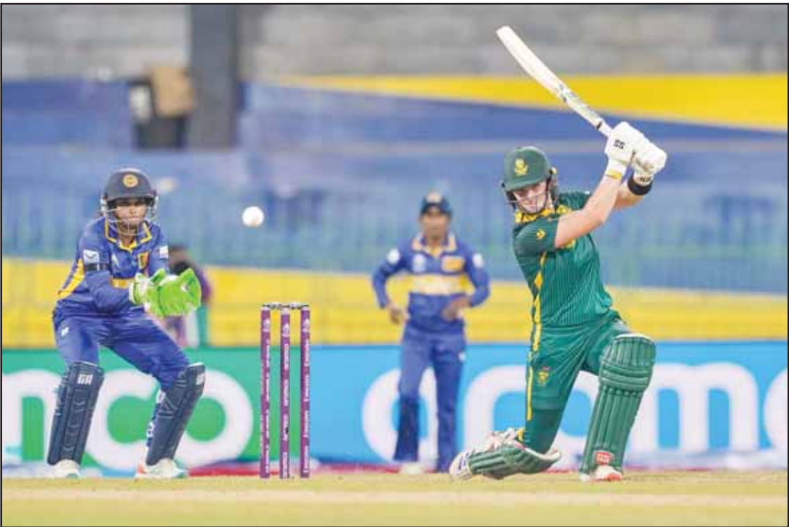
South Africa's captain Laura Wolvaardt hits a boundary during the ICC Women's Cricket World Cup match between South Africa and Sri Lanka at Premadasa Stadium in Colombo, Sri Lanka. (AP)

COLOMBO, Sri Lanka, Oct 18, (AP): South Africa moved closer to the Women's Cricket World Cup semifinals after cruising to a 10-wicket victory against Sri Lanka in a rain-affected game. Captain Laura Wolvaardt's brisk 60 off 47 balls and Tazmin Brits' unbeaten 55 off 42 hurtled South Africa to 125 without loss in 14.5 overs. They reached a revised target of 121 with 5.1 overs to spare and their fourth successive win. Sri Lanka opted to bat first and was 46-2 after 12 overs when rain stopped play for more than five hours. Play resumed just before the cutoff time and was reduced to 20 overs per side. Sri Lanka added 59 runs in eight overs to offer 105-7. "Very relieved we got a game in the end," Wolvaardt said. "It was frustrating sitting out for four or five hours but happy with the two points. We just treated it as a normal T20 game and wanted to get ahead of the game as soon as we could and not leave it late." South Africa rose to second in the eight-team standings, a point behind semifinal-qualified Australia. But Sri Lanka has yet to register a win; it has two points from two rain abandoned games against Australia and New Zealand. Of the eight matches in Colombo so far, three have been rained out, and Sri Lanka-Australia was almost the fourth. Before the rain, Sri Lanka's Vishmi Gunaratne was struck on the knee while taking a single and taken off on a stretcher. But the five-hour delay gave her time to recover, and she returned