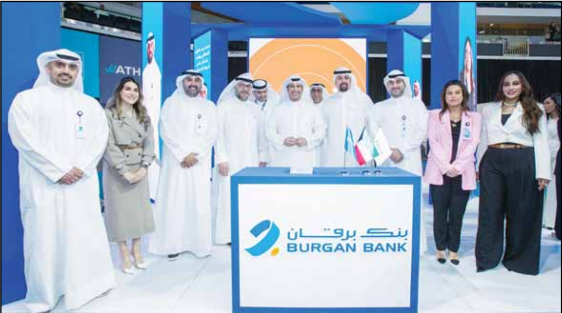
HE Mr. Abdulrahman Al-Mutairi, Minister of Information and Culture and Minister of State for Youth Affairs during his visit to Burgan’s booth.

able conversations around their aspirations for personal and professional development. In addition, the Bank’s on-ground presence among its community allows representatives to directly introduce Burgan Bank’s progressive work environment and its culture of continuous learning. Besides promoting employment and growth opportunities, Burgan Bank representatives were committed to engaging with the career fair visitors, spreading financial literacy. This comes as part of the Bank’s committed support for the “Let’s Be Aware” (Diraya) campaign, led by the Central Bank of Kuwait (CBK) and the Kuwait Banking Association (KBA) with the support of Kuwaiti banks. As a certified Great Place to Work®, Burgan Bank continues to advance its talent acquisition, management, and development strategies using the latest data-driven, AI-supported technologies. This strategic approach earned Burgan Bank multiple regional and international accolades, including three Brandon Hall