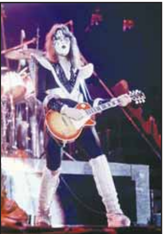
Ace Frehley, lead guitarist for the hard-rock glam band KISS, performs with a Les Paul guitar during a concert at the Civic Center in Harford, Conn., Feb. 16, 1977. Frehley, singer-guitarist Paul Stanley, tongue-wagging bassist Gene Simmons and drummer Peter Criss.

LOS ANGELES, Oct 18, Ace Frehley, the original lead guitarist and founding member of the glam rock band Kiss, who captivated audiences with his elaborate galactic makeup and smoking guitar, died Thursday. He was 74. Frehley died peacefully surrounded by family in Morristown, New Jersey, following a recent fall, according to his agent. Family members said in a statement that they are “completely devastated and heartbroken” but will cherish his laughter and celebrate the kindness he bestowed upon others. Kiss, whose hits included “Rock and Roll All Nite” and “I Was Made for Lovin’ You,” was known for its theatrical stage shows, with fire and fake blood spewing from the mouths of band members dressed in body armor, platform boots, wigs and signature black-and-white face paint. Kiss’ original lineup included