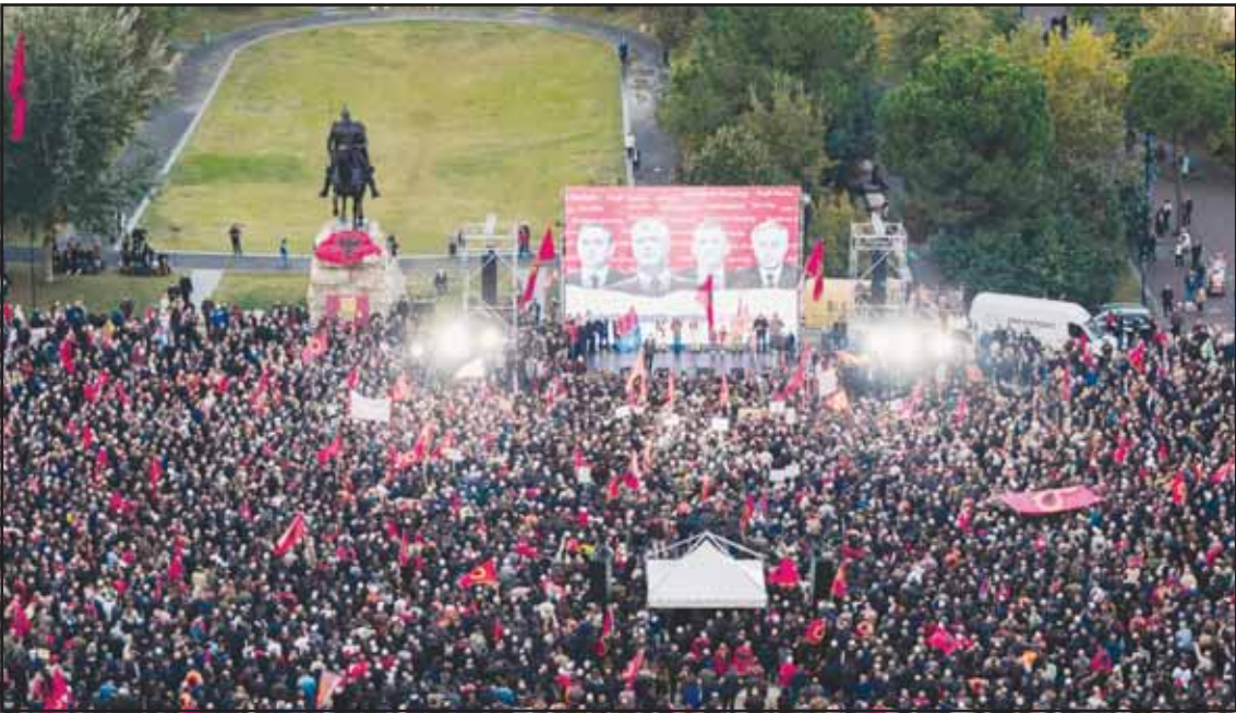
Protesters take part in a rally at Skanderbeg square in central Tirana, Albania, on Oct 17 against war crimes trials being pursued against some of their leaders in The Hague.

belt, Maryland, where he is expected to make an initial appearance before a judge on the 18-count indictment brought against him on Thursday. It's third criminal case brought in recent weeks by the Justice Department against a Trump adversary, and is unfolding against the backdrop of growing concerns that the Republican president is using the law enforcement agency to seek retribution against his perceived enemies.