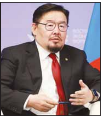
Mongolian Prime Minister Gombojavyn Zandanshatar speaks to Russian President Vladimir Putin during their meeting on the sidelines of the Eastern Economic Forum in Vladivostok, Russia on Sept 4. (AP)

BEIJING, Oct 18, (AP): Mongolia’s parliament has voted to oust the prime minister in an unusually public power struggle within the ruling Mongolian People’s Party. Opponents of Prime Minister Gombojavyn Zandanshatar managed to pass a controversially worded resolution Friday that effectively dismissed him from office. The parliament was also debating a request to resign from its speaker, Amarbaysgalan Dashzegve, the prime minister’s chief rival in the internal party struggle. It wasn’t immediately clear who might succeed Zandanshatar, who is acting prime minister until a successor is named, or whether he would challenge his dismissal. He was named prime minister in June. The political upheaval comes at a critical time because the budget for next year has yet to be passed. Teachers, who are demanding salary hikes in the budget, went on strike this week and medical doctors are threatening to do so too. The ruling party feud began after Zandanshatar lost a party leadership election to Amarbaysgalan. The prime minister’s supporters then accused the speaker of being involved