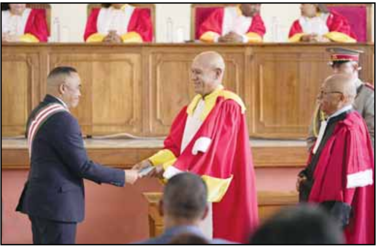
Madagascar High Constitutional Court judges congratulate Col Michael Randrianirina, sworn in as president, at the main chamber of the nation’s High Constitutional Court, in Antananarivo, Madagascar on Oct 17.