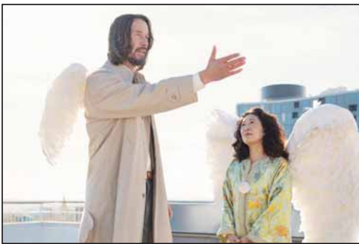
This image released by Lionsgate shows Keanu Reeves, (left), and Sandra Oh in a scene from 'Good Fortune.'

Still, "Good Fortune" is the rare mainstream comedy that doesn't turn its lens away from the tents and RVs all over Los Angeles and the plight of the omnipresent gig worker, toting food all around town and facing the