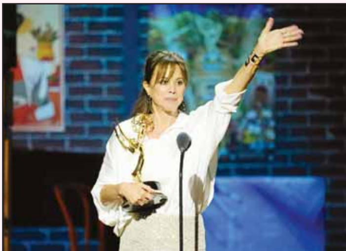
Nancy Lee Grahn waves to the audience after winning Outstanding Lead Actress in a Daytime Drama Series for 'General Hospital.'