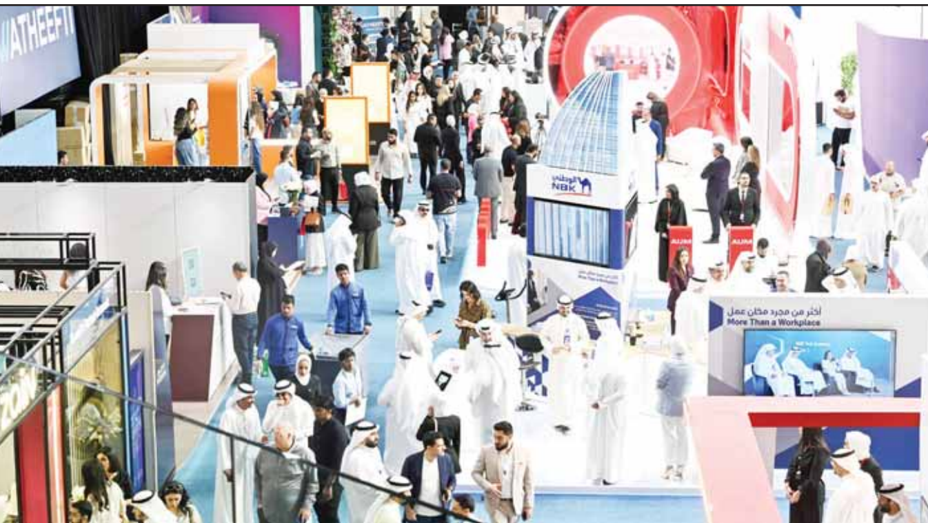
People visit the 'Watheefi' career fair in Hawalli Governorate, Kuwait. The Watheefi career fair launched on Thursday with the participation of more than 80 entities from the public and private sectors. The job fair aims to provide job opportunities and provides a direct communication opportunity for Kuwaiti youth and job seekers.