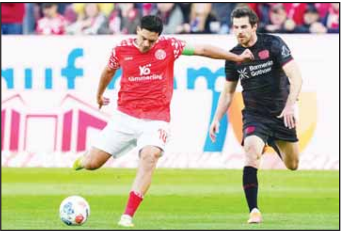
Leverkusen's Jonas Hofmann, right, tries to block a shot from Mainz's Nadiem Amiri during the German Bundesliga soccer match between FSV Mainz 05 and Bayer 04 Leverkusen, in Mainz, Germany.

MUNICH, Oct 18, Álex Grimaldo scored twice and was booked for complaining as Bayer Leverkusen almost squandered a two-goal lead before beating Mainz 4-3 in the Bundesliga on Saturday. Grimaldo converted a penalty and Christian Kofane got another goal before Lee Jae-sung pulled one back for Mainz. Grimaldo scored again before the break but was booked in the 69th when he clearly didn't agree with referee Florian Exner's decision to award Mainz a penalty when Philipp Mwene fell under minimal contact from Arthur. The decision survived a VAR review despite little evidence of a foul, and Nadiem Amiri scored against his former side from the spot. Martin Terrier thought he sealed Leverkusen's win late, then Amiri sent Armando Sieb through to score in the 90th to ensure a nervy finish for the visitors. It was Leverkusen's third straight win under new coach Kasper Hjulmand, who was back at his former team. Hjulmand had an unhappy spell in charge of Mainz in 2014-15. Leipzig held on beat promoted Hamburger SV 2-1 after the home fans honored Hamburg's Danish forward Yussuf Poulsen with a huge tifo in tribute to his 12 years at the club in his first game back. Leipzig was still in the third division when Poulsen joined from Lyngby in 2013.