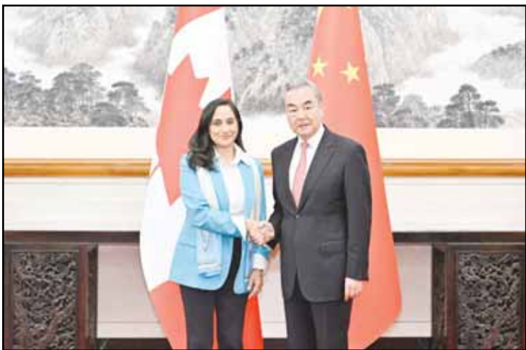
Chinese Foreign Minister Wang Yi, also a member of the Political Bureau of the Communist Party of China Central Committee, holds talks with Canadian Foreign Minister Anita Anand in Beijing, capital of China on Oct 17. (Xinhua)

BEIJING, Oct 18, (Xinhua): Chinese Foreign Minister Wang Yi held talks with his Canadian counterpart, Anita Anand, in Beijing on Friday, with both sides pledging to improve bilateral ties. Wang, who is also a member of the Political Bureau of the Communist Party of China Central Committee, said that this year marks the 55th anniversary of the establishment of diplomatic relations between China and Canada. The course of the development of China-Canada relations shows that the two countries can become partners that achieve mutual success and common development on the basis of mutual respect, he added. Wang noted that China is willing to work with Canada to take the 55th anniversary of their diplomatic ties and the 20th anniversary of their establishment of a strategic partnership as opportunities to resume dialogue and exchange at all levels, guided by the important consensus reached between the leaders of the two countries. He called on the two sides to advance the resolution of each other’s legitimate concerns, explore and tap into cooperation in various fields, expand people-to-people and cultural exchange, and strengthen communica-