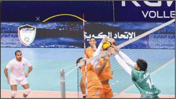
Players challenge for the ball during Kazma and Al-Arabi match.