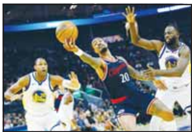
LA Clippers forward/center John Collins (20) grabs the pass as he is double teamed by Golden State Warriors center Al Horford (20) and Warriors forward Draymond Green (23) in the second quarter during an NBA preseason game at Chase Center in San Francisco. Clippers won 106-103.