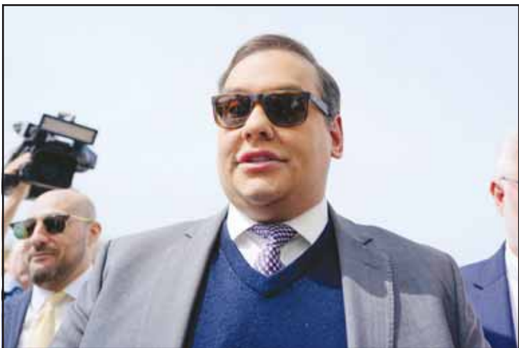
Former US rep George Santos arrives at federal court for sentencing, April 25, 2025, in Central Islip, NY.