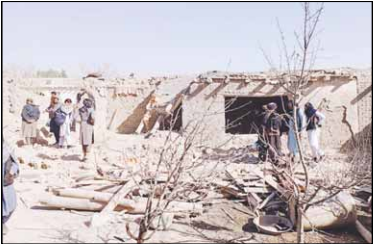
Locals inspect the site of a cross-border attack by the Pakistani army in Afghanistan’s eastern Paktika province on Oct 18. (AP)

ISLAMABAD, Oct 18, (AP): Afghan and Pakistani delegations arrived in the Qatari capital, Doha, on Saturday, hoping to defuse the deadliest crisis between them in several years after more than a week of fighting killed dozens of people and injured hundreds on both sides. Both governments have sent their defense ministers to lead the talks, which, Pakistan said, would focus on “immediate measures to end cross-border terrorism emanating from Afghanistan and restore peace and stability along the border.” Each country says it is responding to aggression from the other. Afghanistan denies harboring militants who carry out attacks in border areas. Regional powers, including Saudi Arabia and Qatar, have called for calm, as the violence threatened to further destabilize a region where groups including the Islamic State group and al-Qaida are trying to resurface. A 48-hour ceasefire intended to pause hostilities expired Friday evening. Hours later, Pakistan struck across the border. Pakistani security officials confirmed to The Associated Press that there were strikes on two districts in Afghanistan’s eastern Paktika province. The targets were hideouts of the