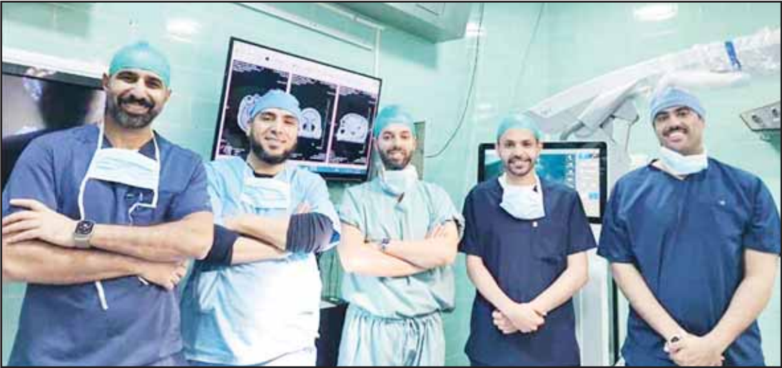
Kuwait medical team after performing the rare cerebral artery bypass surgery.

outbreaks waned later that year, thanks in part to the Jynneos vaccine made by Bavarian Nordic. The other version - known as clade I - likewise can spread through sex, but also through other forms of contact. In Africa it has infected a broader range of people, including children. A newer form of the clade I virus has been widely transmitted in eastern and central Africa. The World Health Organization declared the situation a public health emergency, but last month it said the problem had waned enough that it was no longer an international emergency. Still, “it’s concerning if this virus has come here and now is starting to be transmitted from person to person,” said Dr. William Schaffner, an infectious diseases expert at Vanderbilt University. The case report comes amid a federal government shutdown and the layoffs of hundreds of employees at the Atlanta-based Centers for Disease Control and Prevention - the agency that usually would be involved in responding. Balanji said a few CDC experts have been available to talk to her department about the situation. But Schaffner noted that “the longer the shutdown, the more impaired public health responses are to any outbreaks.” A U.S. Department of Health and Human Services spokesperson referred questions to local health officials.