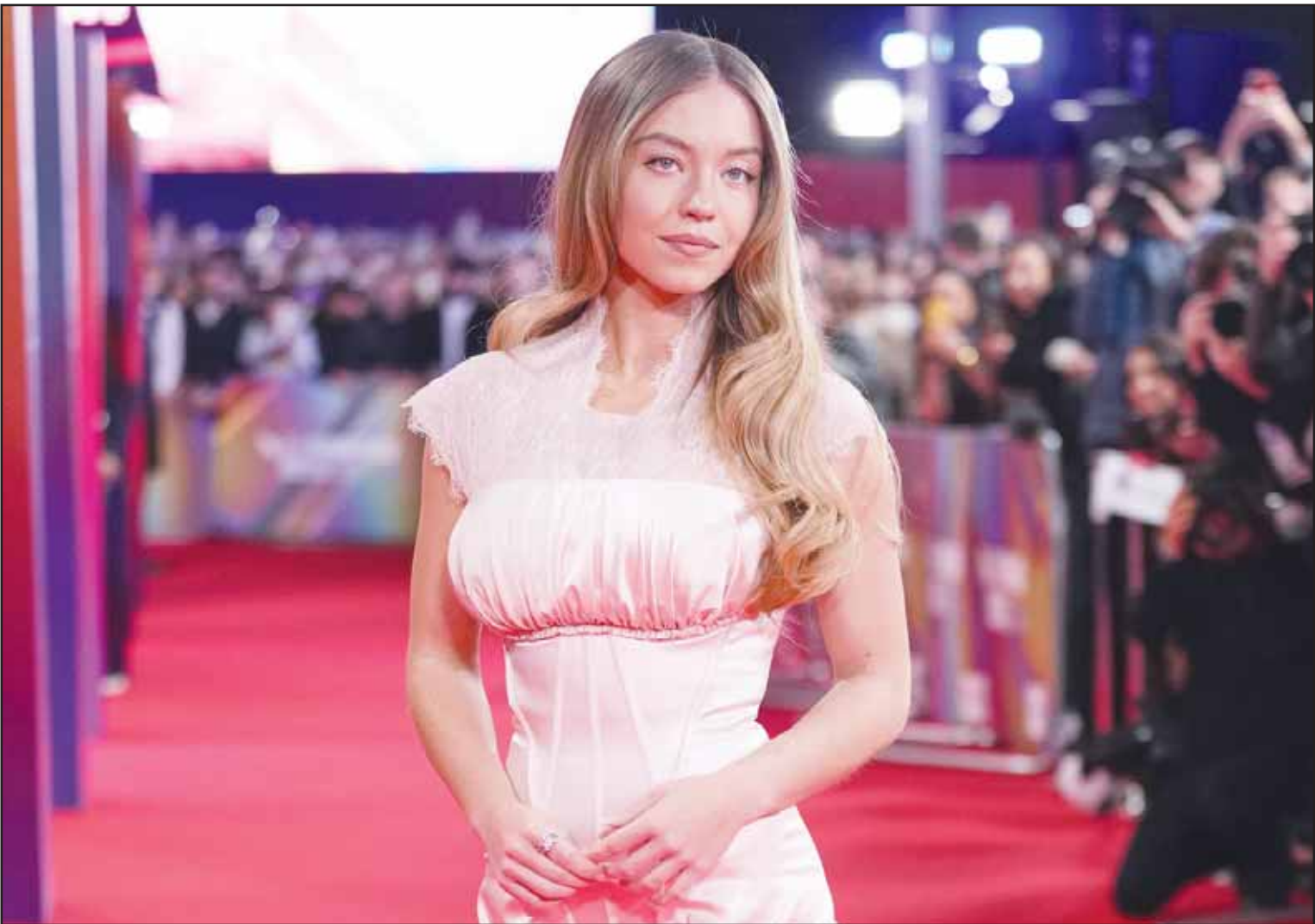
Sydney Sweeney poses for photographers upon arrival at the premiere of the film ‘Christy’ during the London film festival in London, Friday, Oct. 17.