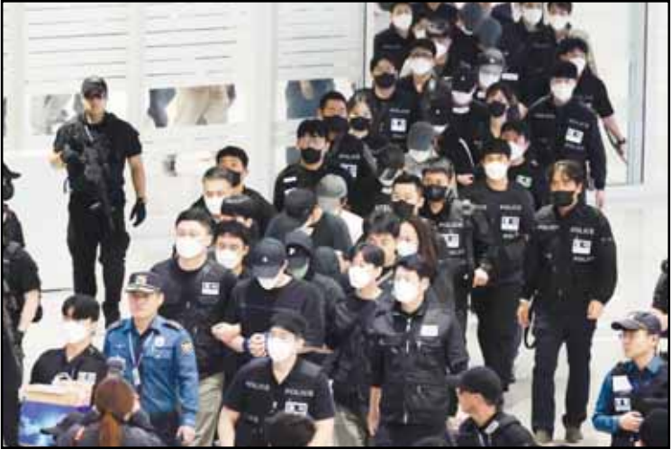
South Koreans, wearing caps, allegedly involved in online scams in Cambodia arrive at the Incheon International Airport, in Incheon on Oct 18.