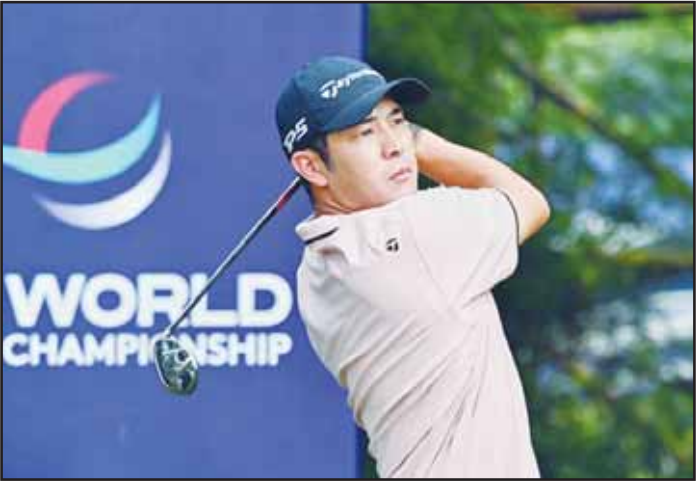
Keita Nakajima of Japan plays a shot on the 3rd green during the DP World Tour Championship golf tournament in New Delhi, India.

NEW DELHI, Oct 18, (Agencies): Japanese golfer Keita Nakajima shot a bogey-free, 7-under 65 to take a two-stroke lead at DP World India Championship after the third round Saturday, moving in sight of his second title on the European tour. The 25-year-old Nakajima, a former top-ranked amateur, has two European Ryder Cup stars as his nearest challengers with Tommy Fleetwood (69) in second place and Shane Lowry (69) a stroke back in third. No. 2-ranked Rory McIlroy, the main attraction at Delhi Golf Club, shot 68 and was in a tie for 15th place - seven strokes off the lead heading into the final round. "I'm probably two shots too far behind to have a realistic chance," McIlroy said. Nakajima birdied four of his first eight holes, and then three in a row from No. 12 over a combined 70 feet to jump clear of then-leader Fleetwood. He parred his way home to retain the lead in his bid for a first title on the tour since March 2024, which also came in India at the Hero Indian Open. Nakajima said the secret to his