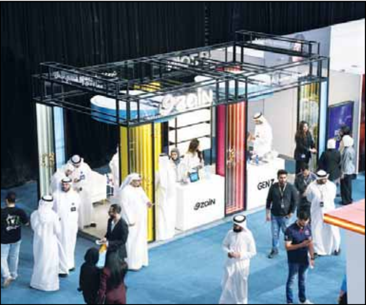
Watheefti offered a valuable opportunity to engage closely with graduates.

that translate this belief into action by harnessing innovation and serving customers with a mindset that delivers our purpose: Better Lives. Lasting Connections.” She added: “Our participation in Watheefti aligns with our 4WARD strategy, which places people and purpose at the heart of Zain’s business. It is embodied by UNITY, an internal cultural and operational transformation program that unifies teams around a shared goal and puts purpose and the customer experience at the core of performance. UNITY translates our leadership’s vision to become a human-centric TechCo, where purpose is the standard for decision-making and a multiplier of impact.”