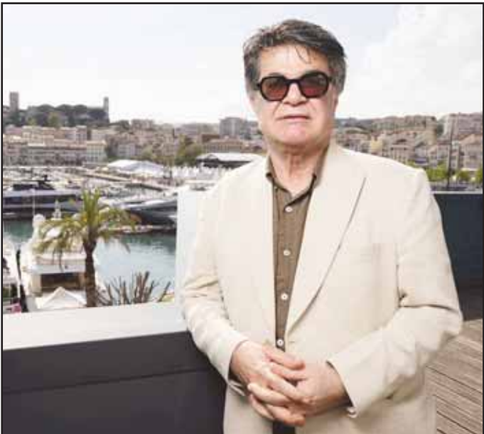
Director Jafar Panahi poses for a portrait photograph for the film 'It Was Just an Accident' at the 78th international film festival, Cannes, southern France, on May 21, 2025.