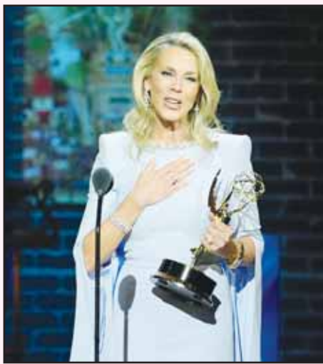
Deborah Norville accepts the Lifetime Achievement Awards during the 52nd Annual Daytime Emmy Awards on Friday, Oct 17, at Pasadena Civic Auditorium in Pasadena, Calif.

Jonathan Jackson of "General Hospital" and first-time nominee Susan Walters of "The