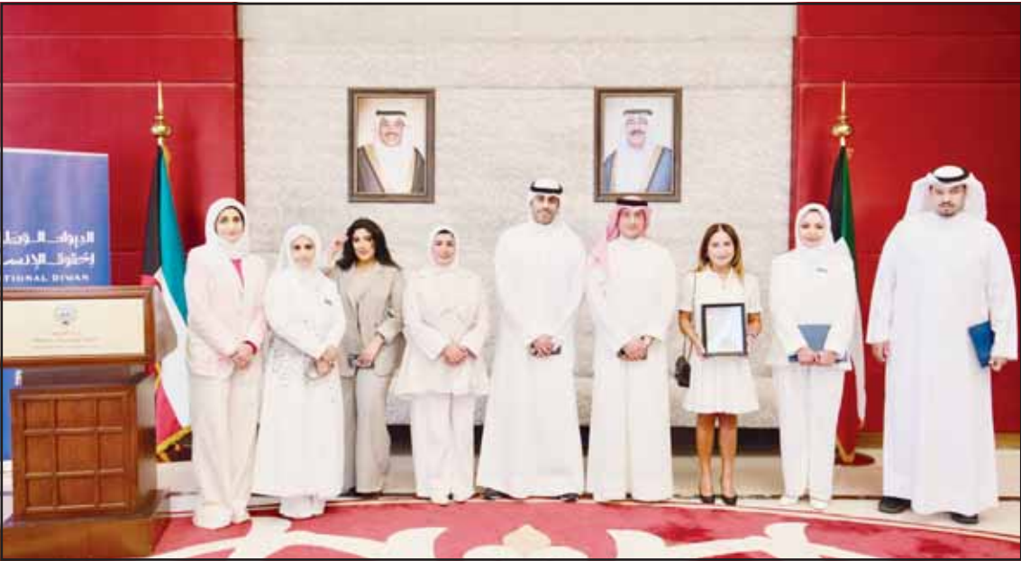
Officials and honorees pose for a group photo during the National Diwan for Human Rights (NDHR) ceremony.