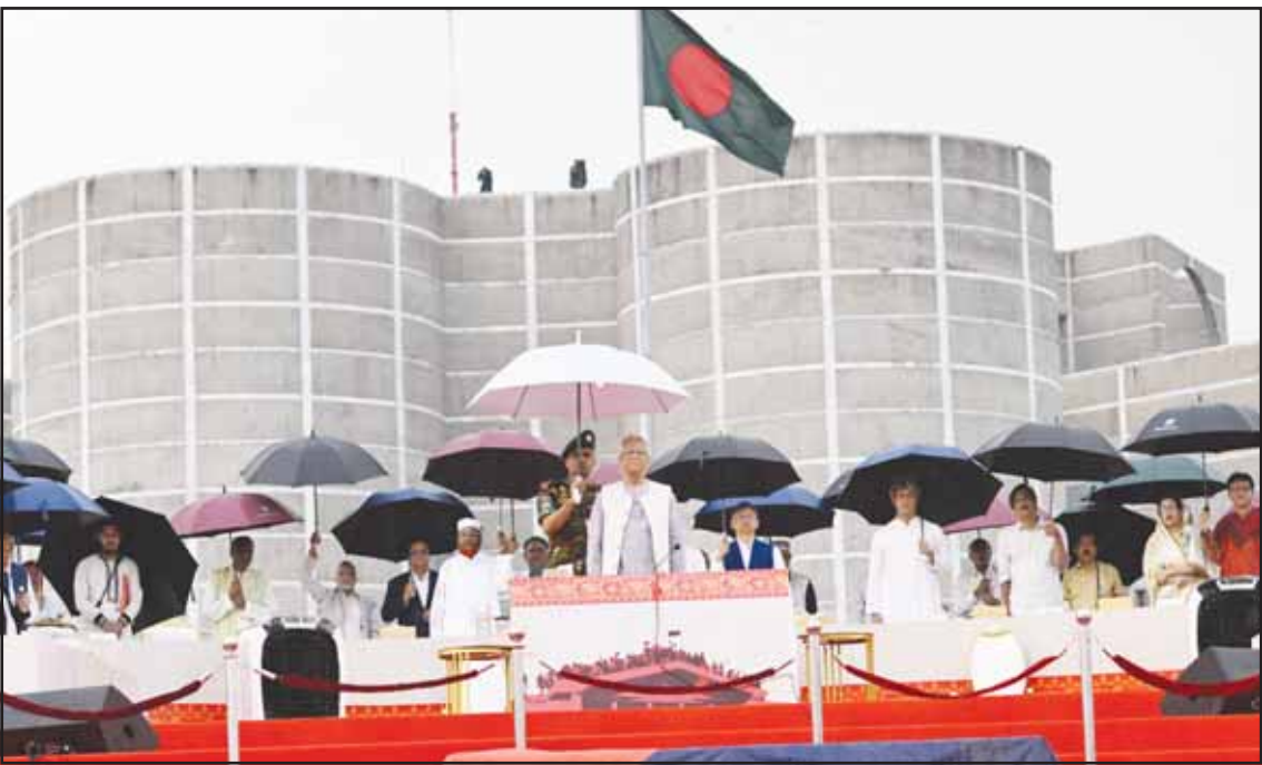
Head of the Bangladesh’s interim government and Nobel laureate Dr. Muhammad Yunus attends an event during the signing of a political charter called ‘Jury National Charter’ was announced, outside Bangladesh’s national parliament complex in Dhaka, Bangladesh on Oct 17.