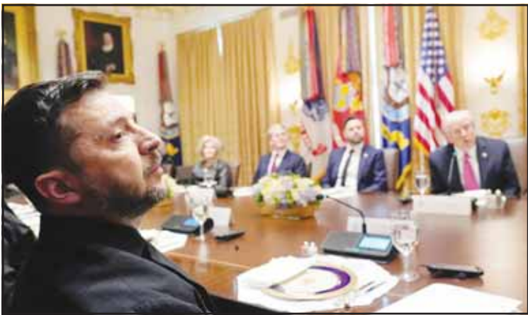
US President Donald Trump, (right), speaks before a lunch with Ukraine's President Volodymyr Zelenskyy, (from left), as White House Chief of Staff Susie Wiles, Treasury Secretary Scott Bessent and Vice President JD Vance listen in the Cabinet Room of the White House on Oct 17, in Washington.

WASHINGTON, Oct 18, US President Donald Trump on Friday called on Kyiv and Moscow to "stop where they are" and end their brutal war following a lengthy White House meeting with Ukrainian President Volodymyr Zelenskyy. Trump's frustration with the conflict has surfaced repeatedly in the nine months since he returned to office, but with his latest comments he edged back in the direction of pressing Ukraine to give up on retaking land it has lost to Russia. "Enough blood has been shed, with property lines being defined by War and Guts," Trump said in a Truth Social post not long after hosting Zelenskyy and his team for more than two hours of talks. "They should stop where they are. Let both claim Victory, let History decide!" Later, soon after arriving in Florida, where he's spending the weekend, Trump urged both sides to "stop the war immediately" and implied that Moscow keep territory it's taken from Kyiv. "You go by the battle line wherever it is - otherwise it's too complicated," Trump told reporters. "You stop at the battle line and both sides should go