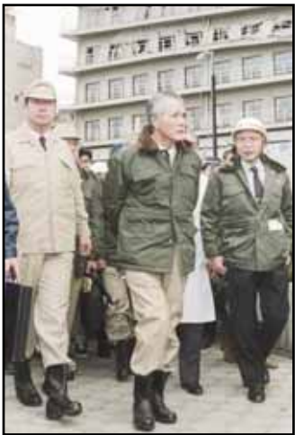
Former Japanese prime minister Tomiichi Murayama, (center), visits a devastated area in Kobe, western Japan, in January 1995, following an earthquake with over magnitude 7 in the area.

TOKYO, Oct 18, (Agencies): Japan’s former prime minister Tomiichi Murayama, who was known for his 1995 “Murayama statement” apologizing to Asian victims of his country’s aggression, died Friday. He was 101. Murayama died at a hospital in his hometown Oita, southwestern Japan, according to a statement by Mizuho Fukushima, the head of Japan’s Social Democratic Party. As head of what was then known as the Japan Socialist Party, Murayama led a coalition government from June 1994 to January 1996. He is best remembered for the “Murayama statement,” an apology he issued on the 50th anniversary of Japan’s unconditional surrender ending World War II on Aug. 15, 1995. It’s seen as Japan’s main expression of remorse for its wartime and colonial past. “During a certain period in the not too distant past, Japan, following a mistaken national policy, advanced along the road to war ... and, through its colonial rule and aggression, caused tremendous damage and suffering to the people of many countries, particularly to those of Asian nations,” he said in the state-