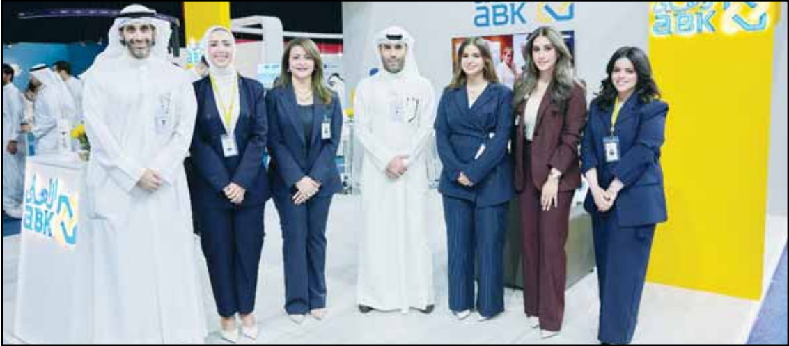
Al-Arbash Intermediate School, a group of HR staff during the exhibition