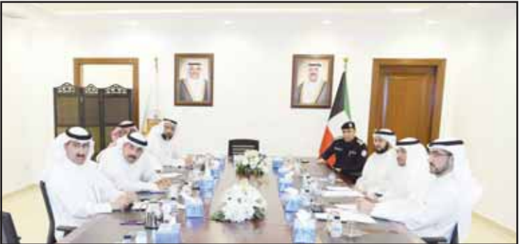
Public health, security and Municipality officials attend Farwaniya complaints session.