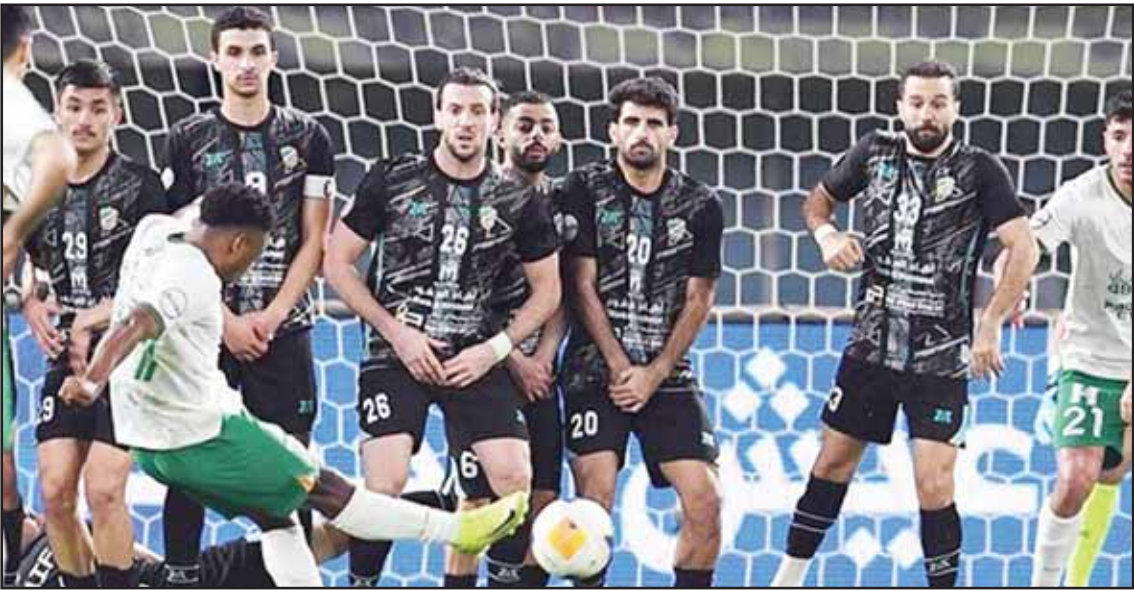
In this file photo, an Al-Arabi player attempts to curl the ball over the defensive wall.

Group B matches, which start next Saturday and feature Al-Seeb (Oman), Al-Ansar (Lebanon), and Bashundhara Kings (Bangladesh). Meanwhile, Al-Shabab, with 7 points, seeks to continue its strong performance and remain competitive. In the second fixture, Al-Salmiya, currently with 9 points, hopes to claim a crucial win in Mansouriya to keep its title hopes alive after more than 25 years without a league crown. The "Sky Blues" aim for their fourth straight victory, signaling their intent to compete for the title. Al-Arabi, with 8 points, looks to secure another win after recording two draws and two wins so far. A victory would boost the team's confidence ahead of its journey to Kyrgyzstan for the Asian Challenge League, where it will compete in Group C against Regar-TadAZ (Tajikistan), Al-Safa (Lebanon), and Muras United (Kyrgyzstan), with matches beginning next Saturday.