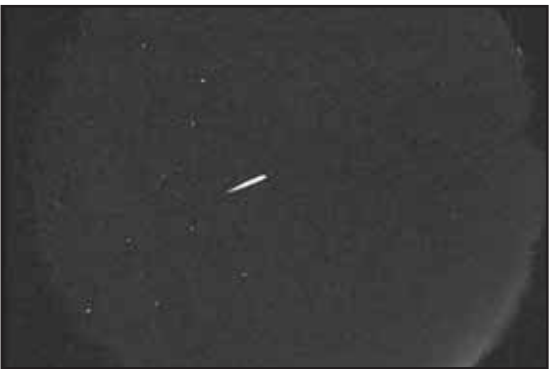
This photo provided by NASA shows a meteor from the Orionid shower on Oct. 13, 2015.