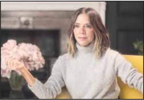
This image released by Netflix shows Victoria Beckham in a scene from her self-titled documentary.

has been edited for length and clarity. AP: The other Beckham documentary appeared only two years ago. Why did you feel the need for your own? Beckham: Well, his documentary wasn’t about me, you know. I was in the documentary as David’s wife and I’ve been part of his journey and I was so honored to talk about that. People’s response to me in that really surprised me, and there was something quite liberating about that because when I saw myself ... I didn’t like how I came across. But then I think I’ve always felt that way about myself. I suppose it gave me the confidence to do my own. AP: What specific stories did you want to tell? Beckham: I’ve been in the fashion industry for almost two decades. I was in the Spice Girls for four years – and have been so defined by that four-year period in my life. A time that I’m so proud of, but I’ve been fighting preconceptions because of that period. I feel that only now is my brand in a place where me talking about my past will not affect the brand that I’ve built. AP: You say this is an inspirational story. How so? Beckham: I’m not ashamed to say I’m really ambitious. And it’s been the first time that I’ve ever looked back and, having that bird’s eye view on my journey so far, even I found it inspiring what I have done ... the fact that I have been told “No” so many