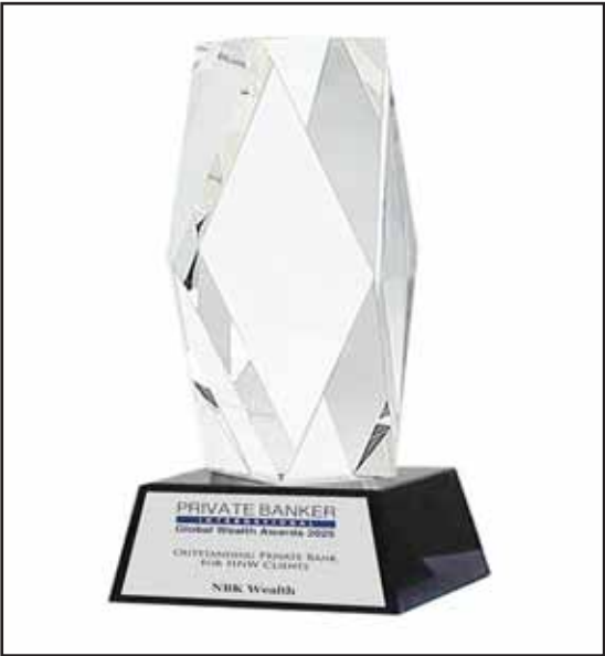
NBK Wealth's award for Outstanding Private Bank for high-net-worth clients for the year 2025.