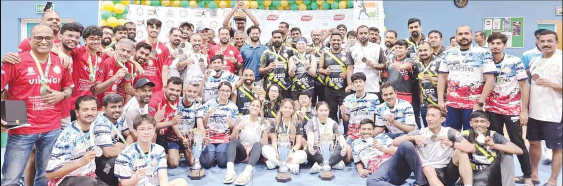
The winners of 10th edition of KDD-KBL celebrate after the closing ceremony.