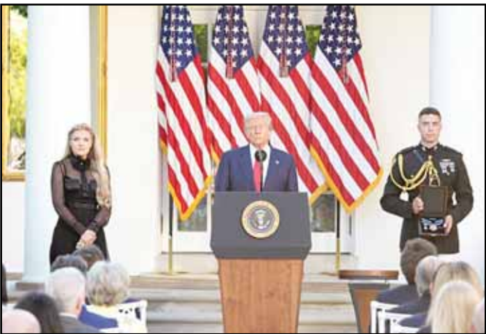
Erika Kirk and US President Donald Trump listen as a military aide reads the citation before Trump posthumously awards the Presidential Medal of Freedom to Charlie Kirk in the Rose Garden of the White House on Oct 14, in Washington.