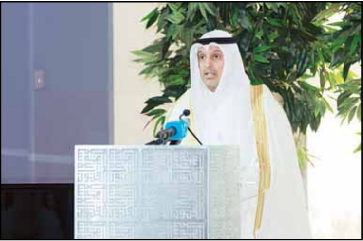
Minister Abdulrahman Al-Mutairi speaks at the inauguration of the exhibition.