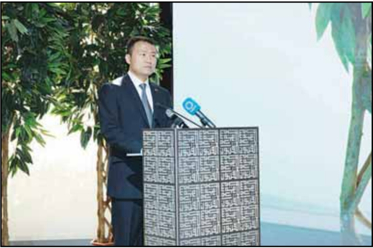
Chinese Embassy Charge d'Affaires Liu Xiang