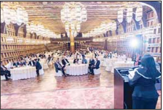
Photos during the event.

panies, ministries, and many industries in Kuwait and across the GCC and MENA. In fact, the company is the only steel manufacturer in Kuwait that has dedicated R&D facilities, provides professional support and parts availability enabling maximum uptime and