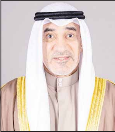
Sheikh Fahad Al-Yousef

It quoted him as affirming depth of the relations between the State of Kuwait with sisterly and friendly states and its keenness on cementing the cooperation with these countries in various fields particularly the