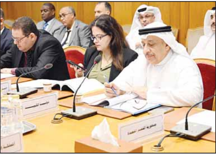
Kuwait’s participation in the meeting of the joint committee of experts and representatives from Arab ministries of justice, interior, and relevant authorities.

She explained that the meeting aims to finalize discussions on the articles of the draft convention, prepare its final version, and submit recommendations to the upcoming joint session of Arab Ministers of Justice and Interior scheduled for November.