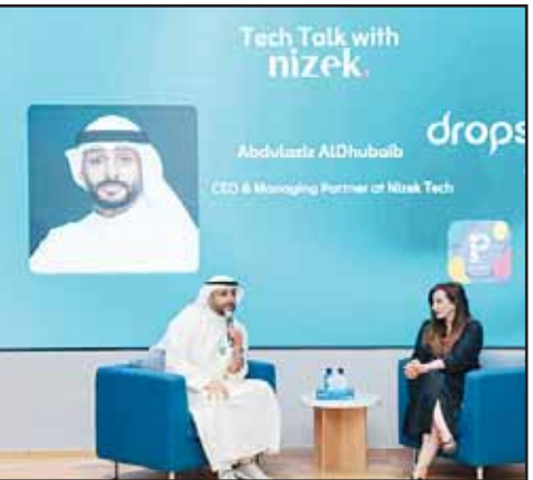
One of the bootcamp sessions.

tures, the Group’s investment arm for emerging technologies, and ZainTECH, its regional digital and ICT solutions arm. For the first time in the program’s 15-plus year history, applications were opened to candidates from Kuwait, Bahrain, Iraq, Jordan, Saudi Arabia, and the United Arab Emirates, creating new opportunities for mentorship, funding, and international exposure. Zain Ventures aims to identify and invest in promising startups from the cohort. ZainTECH will work closely with ZGI to support selected startups joining the Silicon Valley phase, offering expertise in cloud computing, artificial intelligence, analytics, robotics, and other advanced