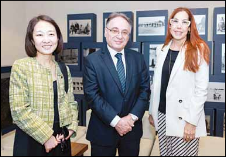
Officials and dignitaries at the event.