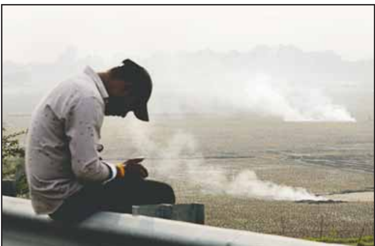
A person checks his mobile phone as farmers burn crop residue after harvest near Bundelkhand expressway in India, on Nov. 17, 2024. to come “anywhere near dealing with the gravity of the climate crisis.” The increase in 2024 is setting the planet on track for more long-term temperature increase, WMO said. It noted that concentrations of methane and nitrous oxide - other greenhouse gases caused by human activity - have also hit record levels. The report was bound to raise new doubts on the world’s ability to hit the goal laid out in the 2015 Paris climate accord of keeping the global average temperature increase to 1.5 degrees Celsius (2.7 degrees Fahrenheit) above pre-industrial times. United Nations climate chief, Simon Stiell, has said the Earth is now on track for 3 degrees Celsius (5.4 Fahrenheit). Meanwhile, the US National Oceanic and Atmospheric Administration’s global data for this year through June reveals that carbon dioxide rates are still rising at one of the highest rates on record, yet not quite as high as from 2023 to 2024. The agency’s monthly data for the long-running Hawaii monitoring location for 2025 through August also showed CO2 rates are still increasing, but not as much as between 2023-2024. □ □ □ The world’s largest maritime nations gathered in London on Tuesday to consider adopting regulations that would move the shipping industry away from fossil fuels to slash emissions. If the deal is adopted, this will be the first time a global fee is imposed on planet-warming greenhouse gas emissions. Most ships today run on heavy fuel oil that releases carbon dioxide and other pollutants as it’s burned. Nations are meeting at the International Maritime Organization headquarters through Friday. The Trump administration unequivocally rejects the proposal and has threatened to retaliate if nations support it, setting the

GENEVA, Oct 15, The United Nations’ food aid agency said Wednesday that severe funding cuts from its top donors are hurting its operations in six countries and warned that nearly 14 million people could be forced into emergency levels of hunger. The World Food Program, traditionally the U.N.’s most-funded agency, said in a new report that its funding this year “has never been more challenged” - largely due to slashed outlays from the US under the Trump administration and other leading Western donors. It warned that 13.7 million of its food aid recipients could be forced into emergency levels of hunger as funding is cut. The countries facing “major disruptions” are Afghanistan, Congo, Haiti, Somalia, South Sudan and Sudan, it said. “We are watching the lifeline for millions of people disintegrate before our eyes,” Executive Director Cindy McCain said. WFP said it expects to receive 40% less funding this year, leading to a projected budget of $6.4 billion - after receiving some $10 billion last year. “This is not just a funding gap