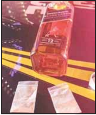
The foreign liquor bottle and sachets of heroin.

Based on the above, the Administrative Court overturned the decision to refuse to register the appeal, obligating the department to register the appeal documents in accordance with the legally prescribed procedures. It also obligated the two defendant administrative bodies to pay the expenses and KD200 for actual attorney fees.