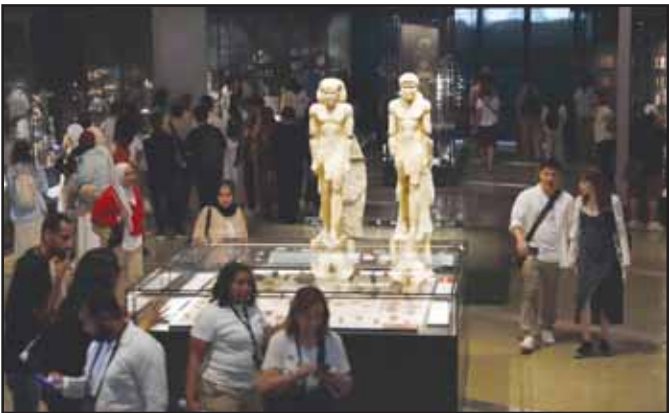
Tourists view exhibits at the Grand Egyptian Museum in Giza, Egypt, Oct. 14.

further than its previous safeguards. Teens will no longer be able to follow accounts that regularly share “age-inappropriate content” or if their name or bio contains something that isn’t appropriate for teens, such as a link to an OnlyFans account. If teens already follow these accounts, they’ll no longer be able to see or interact with their content, send them messages, or see their comments under anyone’s posts, the company said. The accounts also won’t be able to follow teens, send them private messages or comment on their posts. Meta said it already blocks certain search terms related to sensitive topics such as suicide and eating disorders, but the latest update will expand this to a broader range of terms, such as “alcohol” or “gore” - even if they are misspelled. The PG-13 update will also apply artificial intelligence chats and experiences targeted to teens, Meta said, “meaning AIs should not give age-inappropriate responses that would feel out of place in a PG-13 movie.” For parents who want an even stricter setting for their kids, Meta is also launching a “limited content” restriction that will block more content and remove teens’ ability to see, leave, or receive comments under posts.