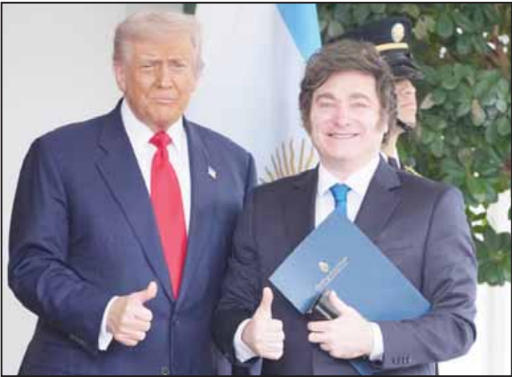
US President Donald Trump greets Argentina's President Javier Milei, as he arrives at the White House on Oct 14, in Washington.

As he opened his lunch with Milei, Trump noted that the Argentine president, who is an economist by trade, is "MAGA all the way." That traditionally refers to his campaign slogan, "Make America Great Again," but this time, it also meant "Make Argentina Great Again."