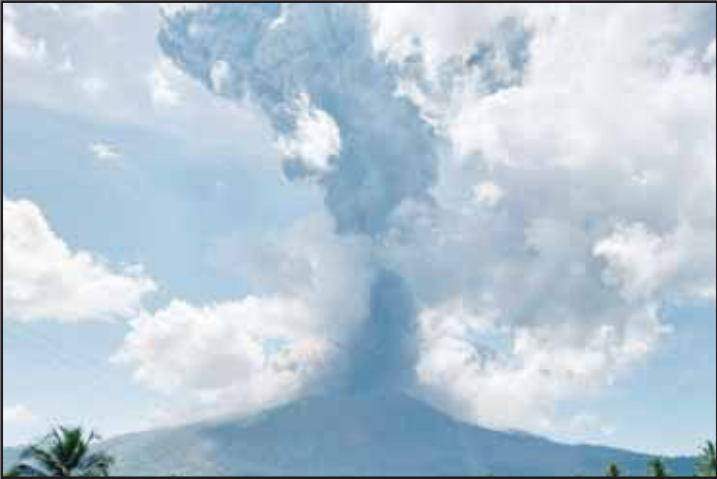
In this photo released by Geological Agency (Badan Geologi) of the Indonesia's Ministry of Energy and Mineral Resources, Mount Lewotobi Laki-Laki spews volcanic material during an eruption in East Flores, Indonesia on Oct 15. (AP)

Vietnam releases draft Party Congress documents: The 13th Communist Party of Vietnam (CPV) Central Committee on Wednesday released draft documents to be submitted to the 14th National Party Congress, inviting public feedback.