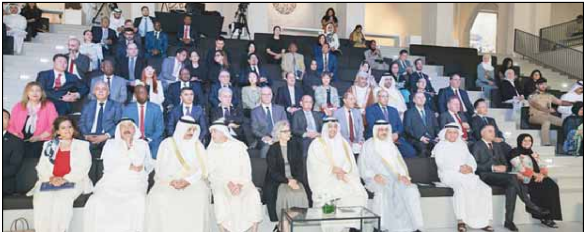
Officials and cultural figures attend the inauguration of the Chinese art exhibition in Kuwait.