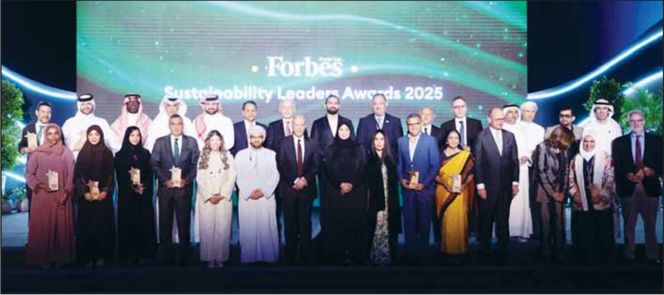
A group photo of the honorees with Her Excellency Dr. Amna bint Abdullah Al Dahak, Minister of Climate Change and Environment in the UAE, and Forbes officials.