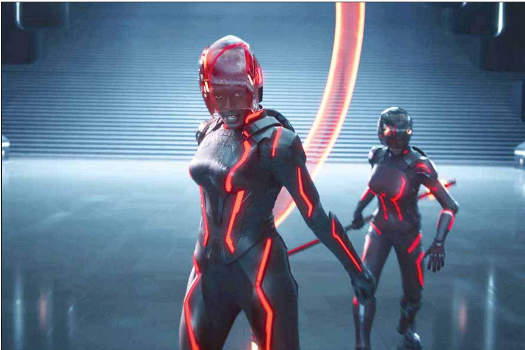
This image released by Disney shows Jodie Turner-Smith (center) in a scene from ‘Tron: Ares.’