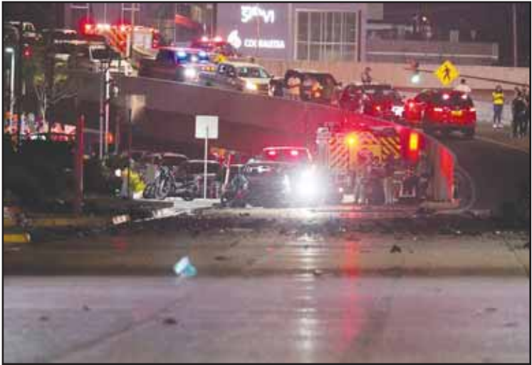
Police, firemen and security officials inspect the damage at the site of a car explosion on a shopping street in Guayaquil, Ecuador on Oct 14.

He met with Trump on Sept 23 while in New York City for the United Nations General Assembly. A flurry of back-slapping, hand-shaking and mutual flattery between the two quickly gave way to Bessent publicly promising Argentina a lifeline of $20 billion. Markets cheered, and investors breathed a sigh of relief.