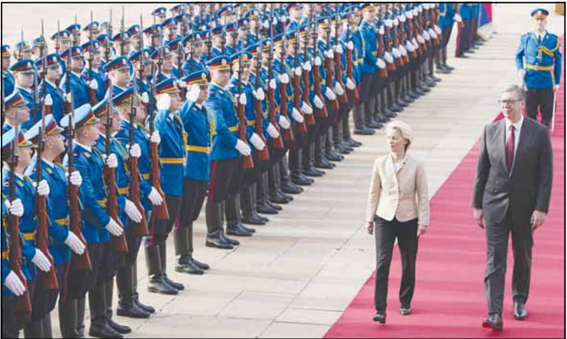
European Commission President Ursula von der Leyen, (center), reviews the honor guard with Serbian President Aleksandar Vucic during a welcome ceremony at the Serbia Palace in Belgrade, Serbia on Oct 15.