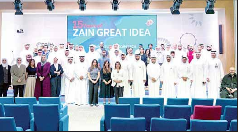
A group pic of the ZGI Kuwait cohort.