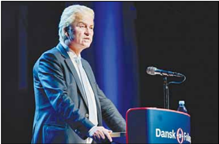
Dutch politician Geert Wilders speaks at the Danish People's Party annual meeting, in Tinghallen, Viborg, Denmark on Sept 27.

lived under round-the-clock protection for 21 years because of "countless death threats of all shapes and sizes." It remains to be seen if Wilders can cobble together a right-wing coalition if he wins the most seats. The leader of the center-right Party for Freedom and Democracy has said that she won't join a coalition with the PVV.