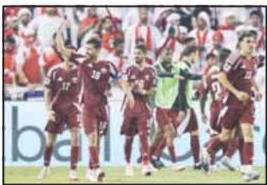
Qatar's Boualem Khoukhi, left, celebrates after scoring the opening goal against United Arab Emirates during the 2026 World Cup qualifying soccer match between Qatar and United Arab Emirates at the Hamad Bin Jassim Stadium in Doha.