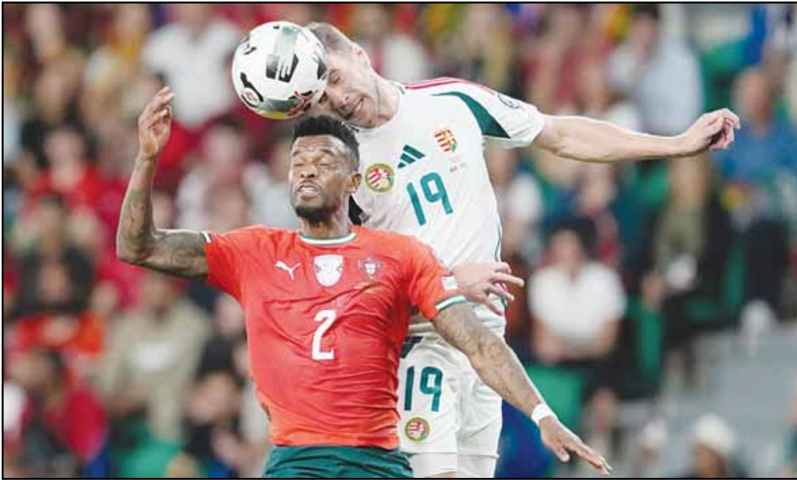
Hungary's Barnabas Varga, top, and Portugal's Nelson Semedo jump for the ball during a World Cup 2026 Group F qualifying soccer match between Portugal and Hungary in Lisbon.

Spain stayed top of its group, three points clear of Turkey, by beating Bulgaria 4-0 to maintain its 100% start to the qualifying campaign.