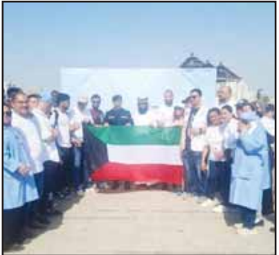
Private sector participating in beach cleanup campaign.

KUWAIT CITY, Oct 15: Kuwait Municipality expressed appreciation to the private sector for participating in its beach cleanup campaigns, reports Al-Rai daily. In cooperation with the private sector and under the patronage of Capital Governor Sheikh Abdullah Salem Al-Ali, the Municipality recently organized a campaign titled, “Our Beaches Are Beautiful, Let Us Preserve Them”, to clean the Kuwait Towers Beach. In a press statement, the Public Relations Department at the Municipality commended Kuwait Continental Hotel Group and its employees for their efforts to maintain the cleanliness of the beach. It disclosed that the campaign includes conveying awareness messages to encourage citizens and expatriates to maintain the cleanliness of beaches and public facilities. It added that “the field team from the Public Sanitation and Road Works Depart-