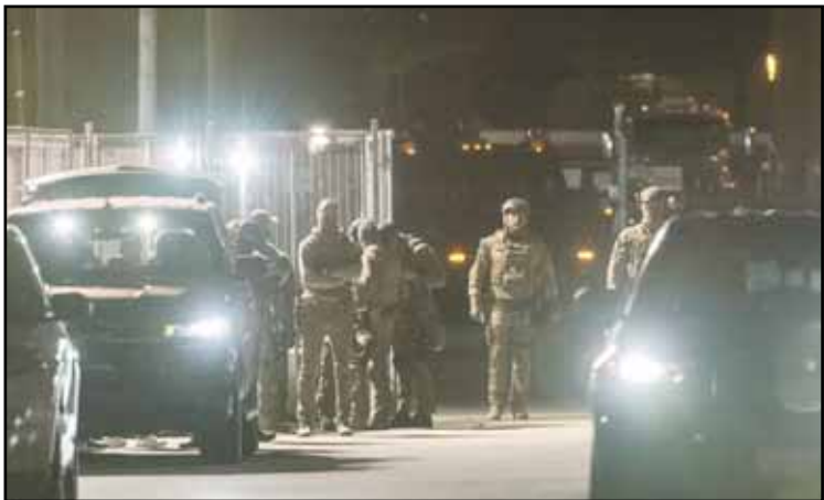
Federal law enforcement officers stand guard in the open gate of the fence built on Beach Street outside the Broadview ICE processing facility in suburban Broadview on Oct 14.