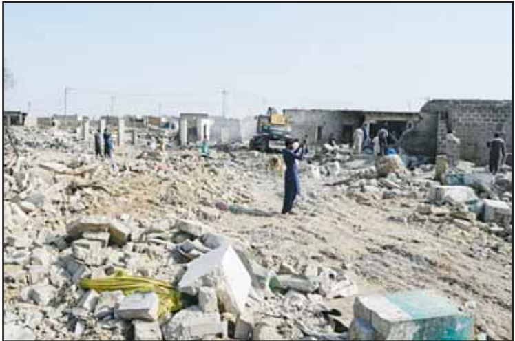
People walk through rubble as a hydraulic shovel demolish a structure during an operation against illegal settlement of Afghan refugees conducted by local government, on the outskirts of Karachi, Pakistan on Oct 15.

Pakistan forces said they had repelled "unprovoked" assaults, but denied targeting civilians after the Taliban government said more than a