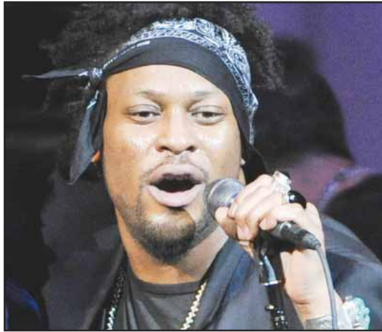
This March 7, 2013 file photo shows D’Angelo at ‘The Music of Prince’ tribute concert at Carnegie Hall in New York on March 7, 2013.

Beyond his own catalog, D’Angelo’s artistry shined in collaborations. He memorably duetted with Lauryn Hill on the soulful ballad “Nothing Even Matters,” a highlight of her landmark 1998 album “The Miseducation of Lauryn Hill.” He