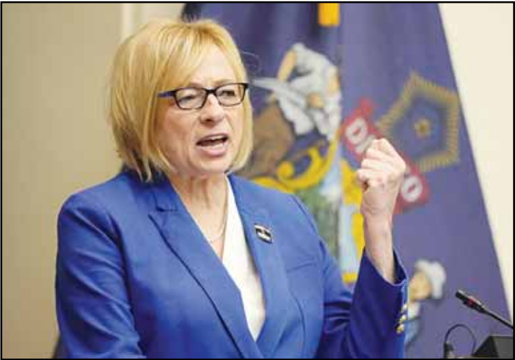
Democratic Gov Janet Mills delivers her State of the State address on Jan 30, 2024, at the State House in Augusta, Maine.

Also: PORTLAND, Maine: The New England governor who told President Donald Trump to his face that she would