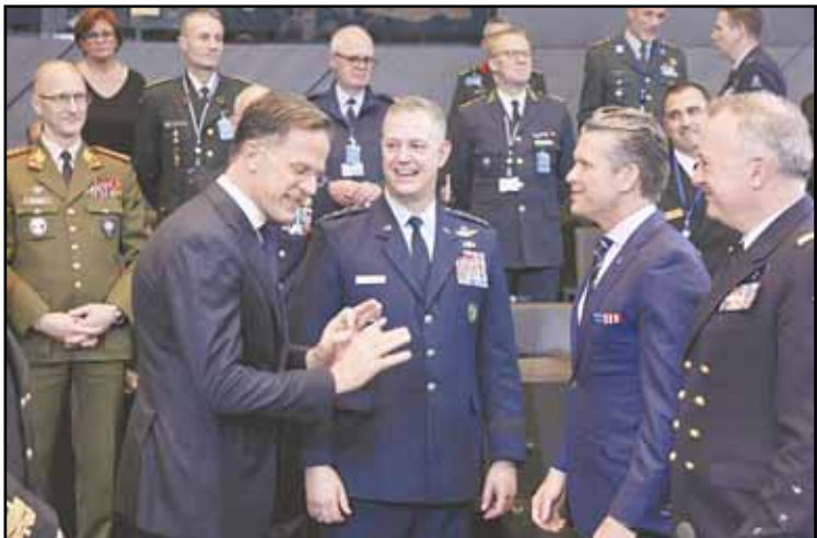
United States Defense Secretary Pete Hegseth, (center right), speaks with NATO Secretary General Mark Rutte, (center left), and Supreme Allied Commander Europe (SACEUR), General Alexus G. Grynkeiwich, (center), during a meeting of the North Atlantic Council in defense ministers format at NATO headquarters in Brussels on Oct 15.

been going down and we want to see more stepping up," Jonson told reporters at NATO headquarters, where defense ministers were meeting. Estonian Defense Minister Hanno Pevkur also expressed concern about a drop in Western backing, noting that "the reality is that the share of the US contributions to Ukraine has decreased significantly this year."