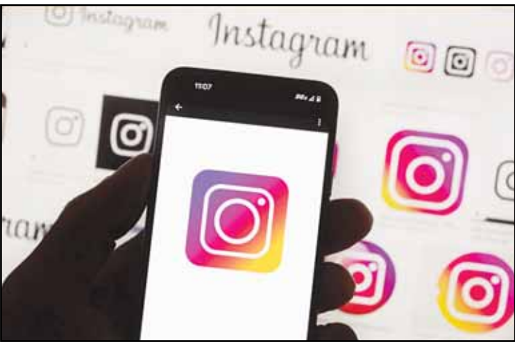
The Instagram logo is seen on a cell phone in Boston Oct 14, 2022. (AP)

NEW YORK, Oct 15, (AP): Teenagers on Instagram will be restricted to seeing PG-13 content by default and won’t be able to change their settings without a parent’s permission, Meta announced on Tuesday. This means kids using teen-specific accounts will see photos and videos on Instagram that are similar to what they would see in a PG-13 movie - no sex, drugs or dangerous stunts, among others. “This includes hiding or not recommending posts with strong language, certain risky stunts, and additional content that could encourage potentially harmful behaviors, such as posts showing marijuana paraphernalia,” Meta said in a blog post Tuesday, calling the update the most significant since it introduced teen accounts last year. Anyone under 18 who signs up for Instagram is automatically placed into restrictive teen accounts unless a parent or guardian gives them permission to opt out. The teen accounts are private by default, have usage restrictions on them and already filter out more “sensitive” content - such as those promoting cosmetic procedures. The company is also adding an even stricter setting that parents can set up for their children.