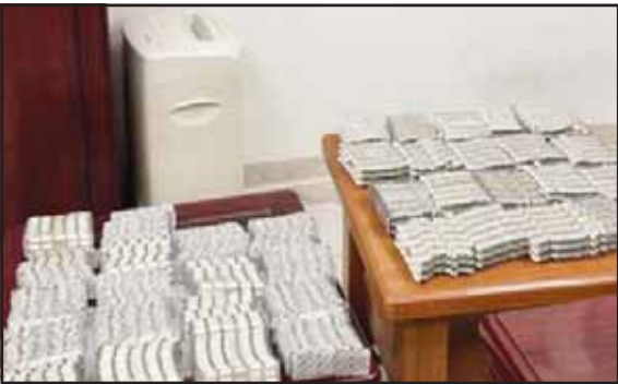
Abdali customs seize huge quantity of drug pills.

Unfortunately, some brain-washed individuals believe these lies.