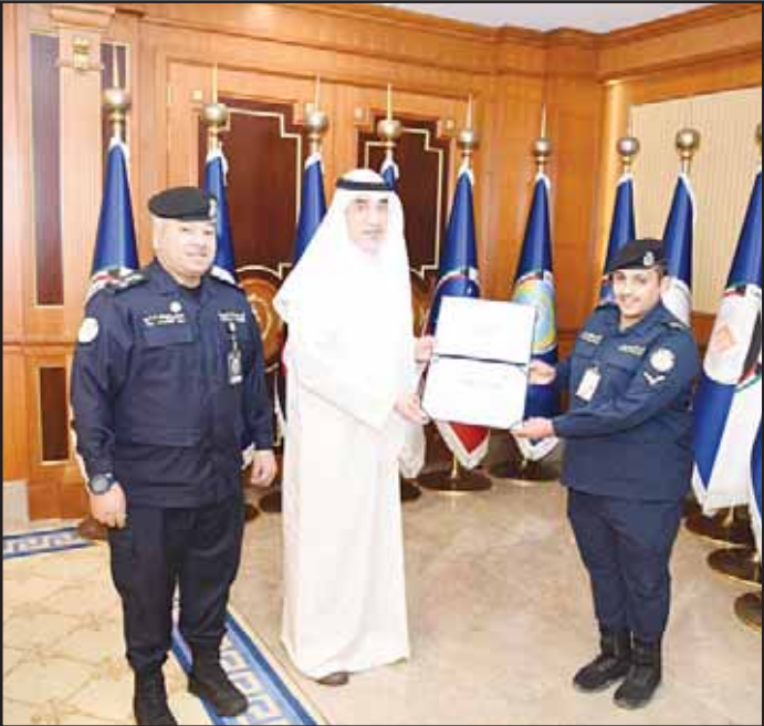
The First Deputy Prime Minister and Minister of Interior honors a corporal at the land ports security for his dedication to his duty.

The ministry affirmed that this security achievement reflects the vigilance and professionalism of Land Border Security officers in safeguarding the country’s borders and preventing unlawful crossings, praising their commitment and high sense of responsibility in upholding the law.