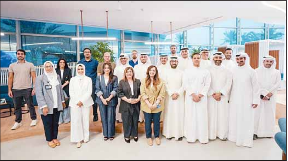
A group pic of the mentors from the speed mentoring sessions.

technologies that drive growth. The expansion marks a major milestone for ZGI, as previous editions focused on the Kuwaiti market. The new regional launch underscores Zain’s long-term commitment to advancing technological innovation and entrepreneurship across the region.