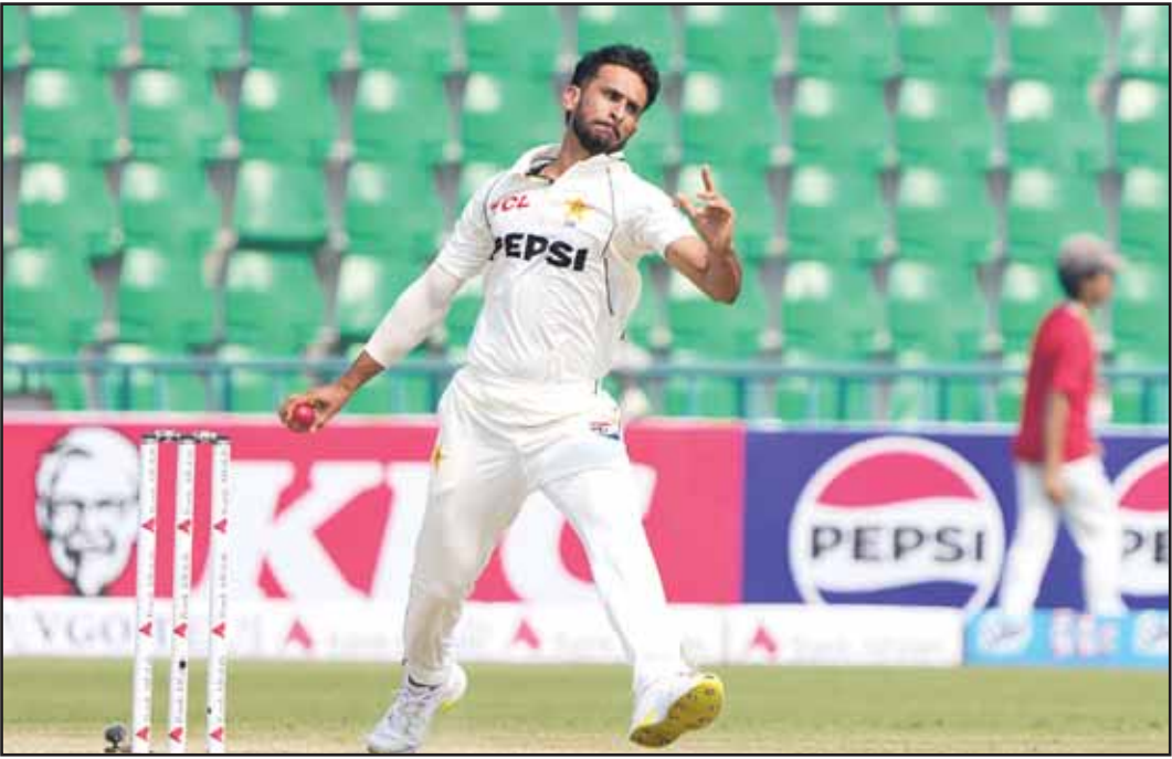
Pakistan’s Hasan Ali bowls during the fourth day of the first test cricket match between Pakistan and South Africa, in Lahore, Pakistan.

leg. Tristan Stubbs’ struggle against spin continued before he got a leading edge from a mistimed reverse sweep against Noman and gave a chest-high catch to Salman Ali Agha in the slips on 2. Dewald Brevis and Ryan Rickelton tried to put the chase back on track with an attractive 73-run stand but both fell before lunch to give Pakistan a clear advantage. The 22-year-old Brevis, playing in only his third test and renowned for his batting exploits in white-ball cricket, had an early reprieve when Pakistan went for an lbw review from the first ball he faced off Noman. Brevis then cut loose as he hoisted Noman for a straight six and two boundaries in one over before raising his half century with an edged boundary. He also lofted the left-arm for another straight six.