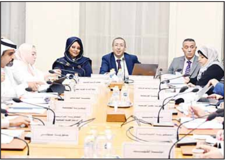
The third meeting of the joint committee of experts and representatives of the ministries of justice and interior and relevant authorities in Arab countries.

CAIRO, Oct 15, (KUNA): The Arab League on Wednesday affirmed the importance of adopting the draft Arab Convention on Personal Data Protection to ensure information security and safeguard digital privacy across member states within the Arab region.