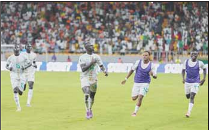
Senegal's Sadio Mane, centre, celebrates with teammates after scoring his side's first goal during a World Cup Group B qualifying soccer match between Senegal and Mauritania at the Stade Abdoulaye Wade in Dakar, Senegal.

JOHANNESBURG, Oct 15, South Africa is back at the World Cup for the first time since hosting the tournament in 2010. Ivory Coast and Senegal will also be there as the latest teams from Africa to qualify.