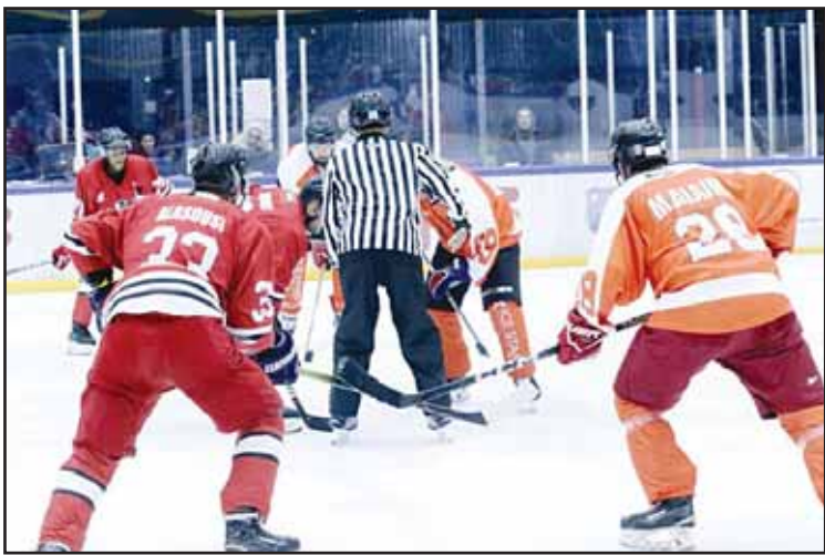
Action from Kuwait National Men's Ice Hockey League.