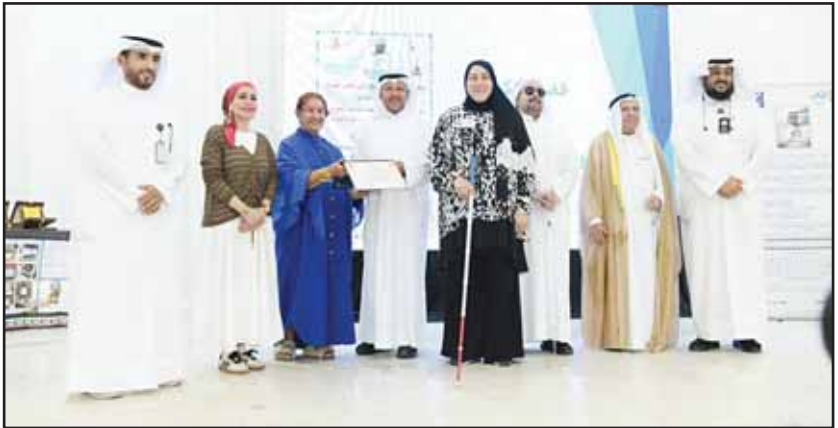
Farwaniya Governor Sheikh Athbi Nasser Al-Athbi Al-Sabah honors participants during the 4th International White Cane Day celebration at the Community Development Center in Abdullah Al-Mubarak.

followed by the government and investment sectors with nine plots each, and the industrial and agricultural sectors with five plots each. The newspaper obtained a copy of the report, indicating that the total load provided to new customers reached 81,599 kilowatts with Jahra Governorate ranking first in terms of electricity connection, followed by Farwaniya Governorate, Ahmadi Governorate, Capital Governorate, Mubarak Al-Kabeer Governorate and Hawalli Governorate. According to the report, the total electricity connection load increased in September, reaching 81,599 kilowatts, compared to 75,881 kilowatts in August -- a difference of 5,716 kilowatts. Meanwhile, the Statistics Department at the ministry disclosed that 563,751 megawatts were imported from the Gulf Interconnection Network in September.