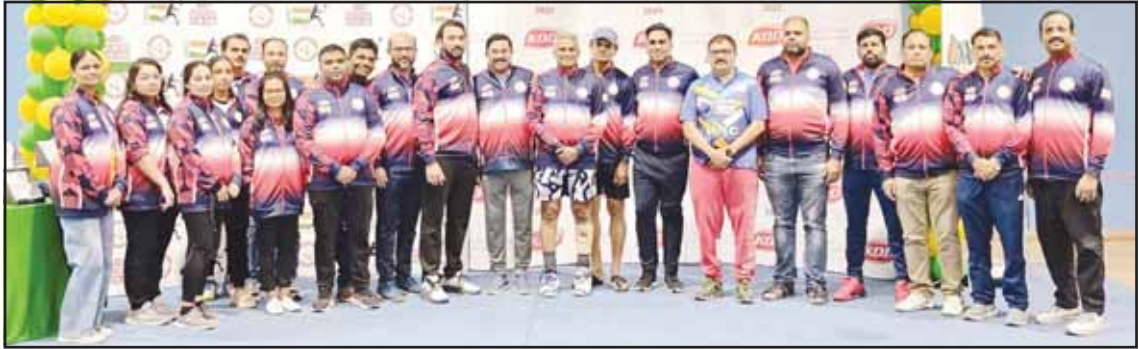
The officials of the tournament.