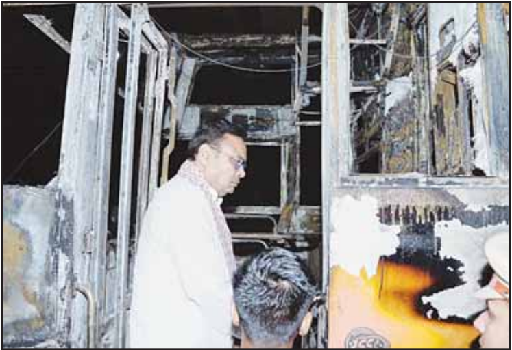
This photograph shared by Indian State Rajasthan Chief Minister's office shows Chief Minister Bhajan Lal Sharma inspecting a charred passenger bus after a suspected short circuit sparked a deadly bus fire near Jaipur, India on Oct 14.

Although Kibaki, of the Kikuyu ethnic group, had posted good economic figures in his first term, his government had been weakened by corruption scandals. The official results - Odinga's 44% against Kibaki's 46% - was the closest in Kenyan history.