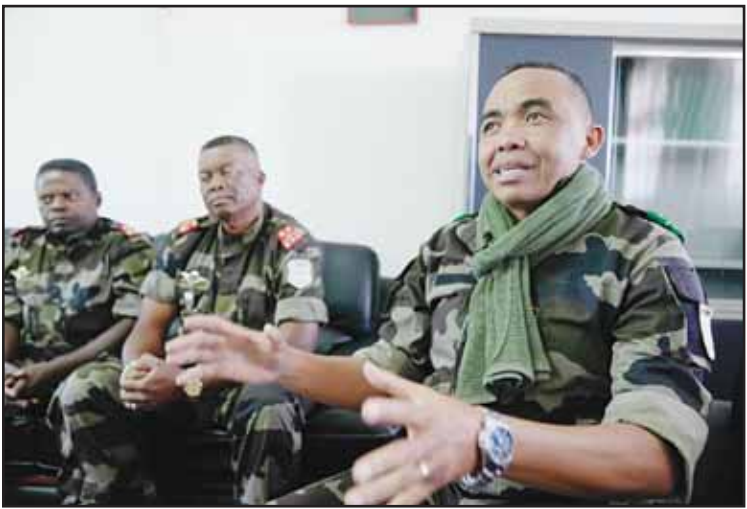
CAPSAT military unit commander Col. Michael Randrianirina during an interview with The Associated Press in Antananarivo, Madagascar on Oct 15.

"There must be an oath-taking" to make his position official, Randrianirina said. The protests reached a turning point on Saturday when Randrianirina and soldiers from his elite CAPSAT military unit rebelled against Rajoelina and joined demonstrations calling for the president to step down, forcing Rajoelina to flee.