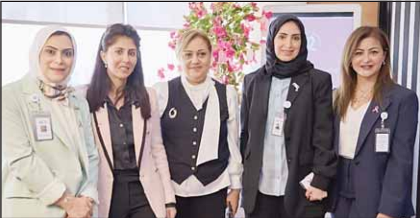
Group photo on the sidelines of the event.

Furthermore, all participants were urged to spread the