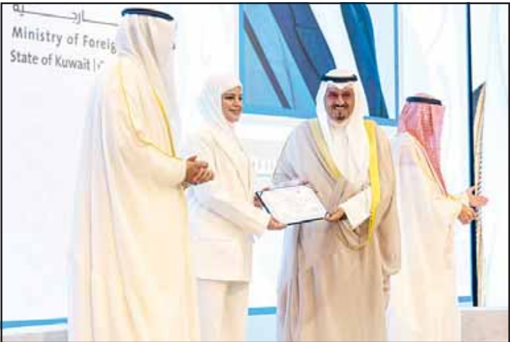
His Highness the Prime Minister Sheikh Ahmad Abdullah Al-Ahmad Al-Sabah presents certificates to the successful graduates at the ceremony.