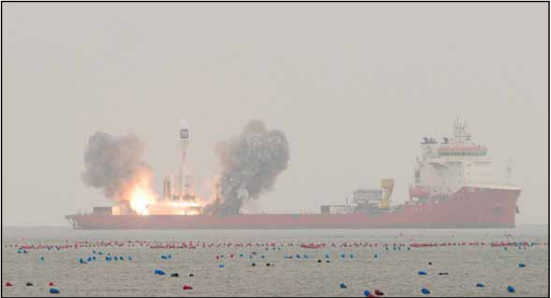
A Gravity-1 carrier rocket carrying a wide-field satellite and two experimental satellites blasts off from waters off the coast of Haiyang, east China’s Shandong Province, Oct. 11.