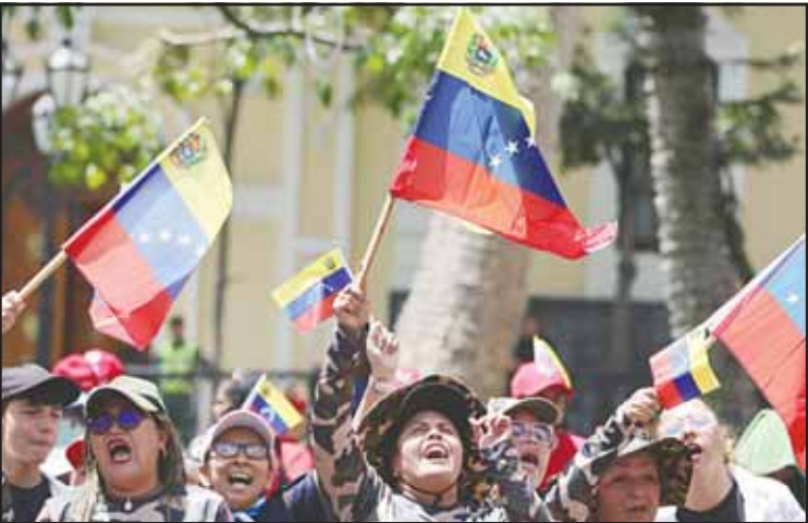
Members of Bolivarian militias gather for military exercises in Caracas, Venezuela on Oct 4. (AP)

UNITED NATIONS, Oct 12, (AP): The United States clashed with Venezuela and its allies at an emergency meeting of the UN Security Council on Friday, with the Trump administration vowing to use its "full might" to eradicate drug cartels and the Maduro government saying it anticipates "an armed attack." Venezuela asked for the meeting of the UN's most powerful body following deadly US military strikes on four boats that Washington says were carrying drugs. Venezuela accused US President Donald Trump of seeking to topple President Nicolás Maduro and threatening "peace, security and stability regionally and internationally." The Trump administration has said three of the targeted boats set out to sea from Venezuela. The strikes, which the US said killed 21 people, followed a buildup of US maritime forces in the Caribbean unlike any seen in recent times. "The belligerent action and rhetoric of the US government objectively point to the fact that we are facing a situation in which it is rational to anticipate that in the very short term, an armed attack is to be perpetrated against Venezuela," Venezuela's UN Ambassador Samuel Moncada said. While Venezuela got support from