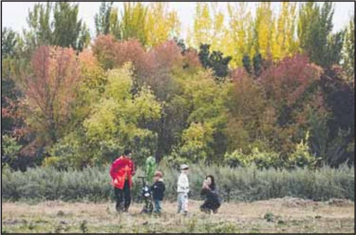
Tourists enjoy the autumn scenery in the Changchun Botanical Garden in Changchun, northeast China's Jilin Province, on Oct 12. (Xinhua) Police reported that an accident happened late Saturday night in Lucena City as the speeding truck lost control, rammed the sidewalk gutter and plowed into vehicles and houses. The fatalities include the 34-year-old male truck driver and a resident of one of the houses, while some injured people were sent to a local hospital. Three of the vehicles caught fire after the crash, police added. (Xinhua)

4 killed as truck rams into 11 vehicles in Philippines: Four people were killed and some were injured as a truck rammed into 11 vehicles and three houses along a highway in Quezon province, southeast of Manila, police said Sunday.