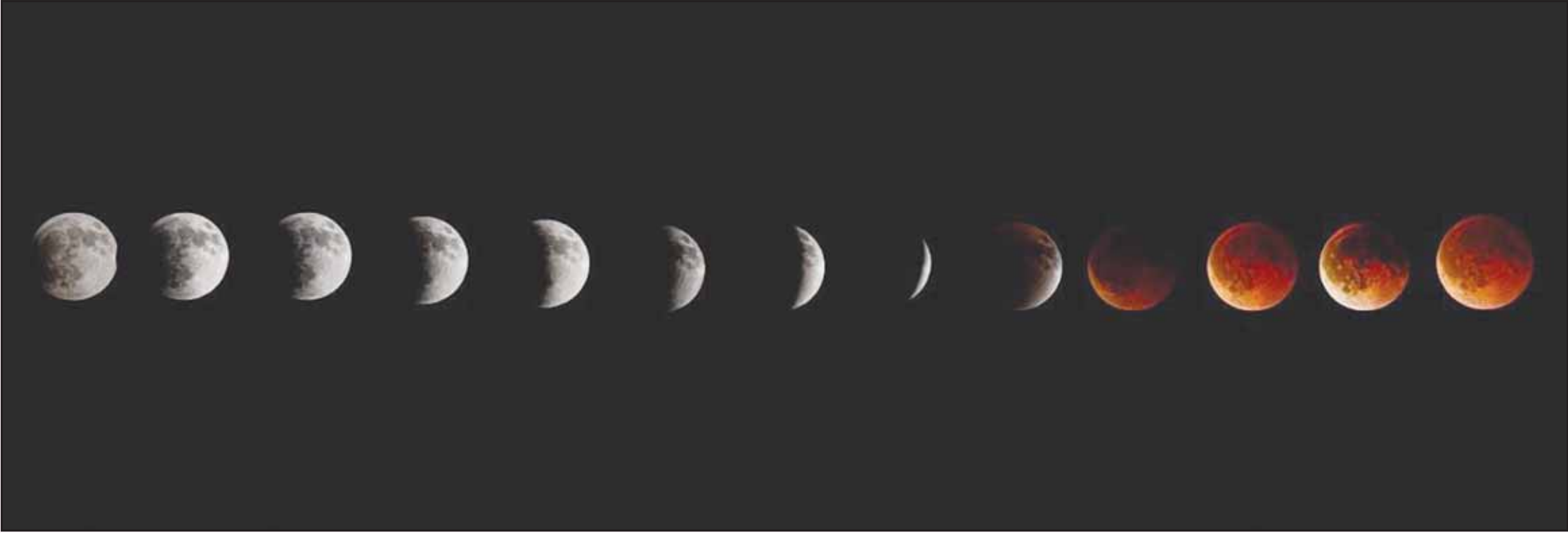
A photo in the ‘Lunar Eclipse Phases’ category.