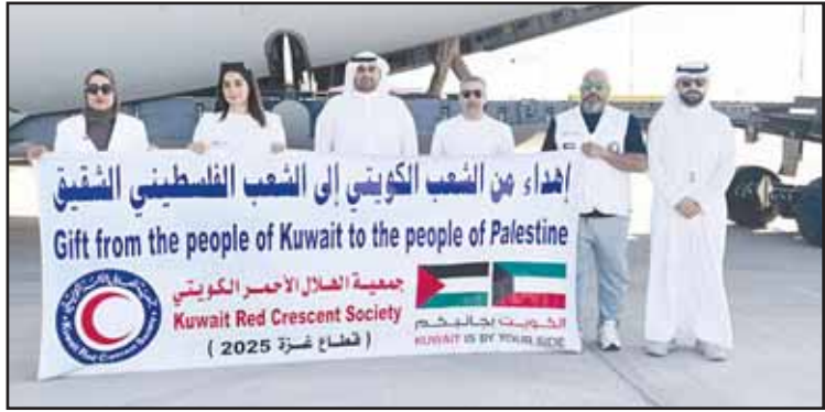
Official bodies participating in the 19th relief flight of the second Kuwaiti airlift to aid Gaza.

His Highness the Prime Minister also sent a congratulatory cable to the President of Equatorial Guinea, Teodoro Obiang Nguema Mbasogo, on the occasion of his country’s Independence Day.