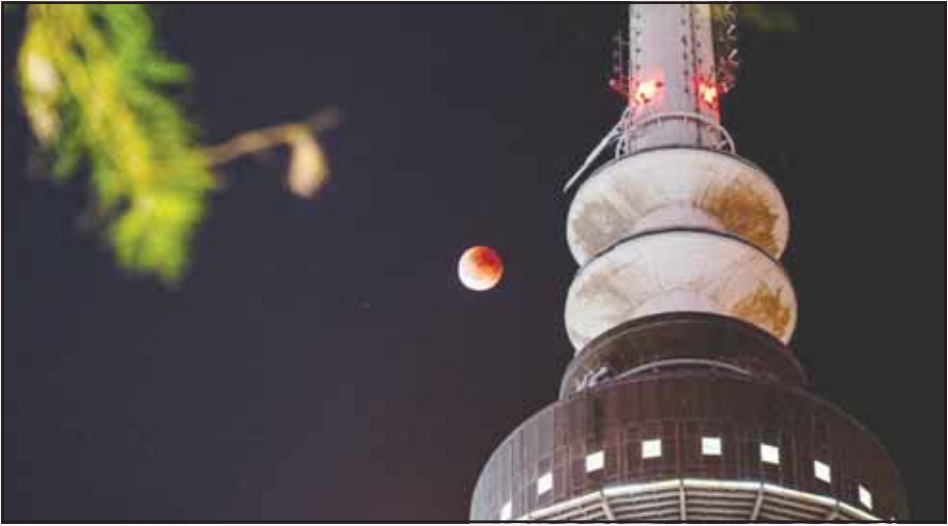
‘Lunar Eclipse with Landscape’ category photo.