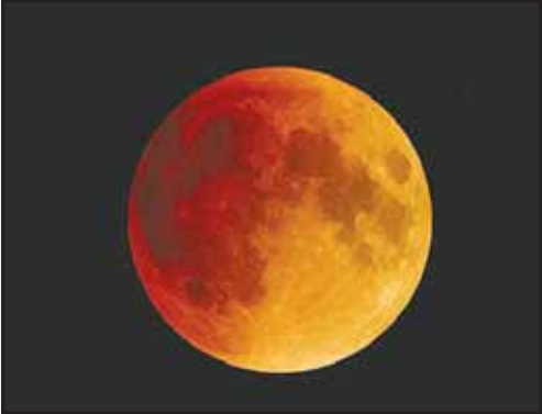
‘Blood Moon’ category photo.