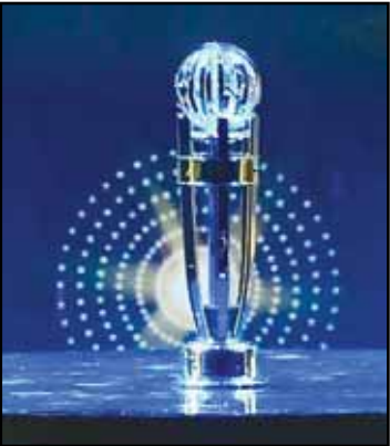
A file photo of the AFC Best Player trophy ahead of the 2025 awards.

nominees, affirming that the AFC looks forward to celebrating the men and women whose achievements continue to inspire future generations, while commending the dedication of national and regional federations to advancing football across Asia.