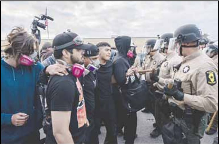
Illinois State Police move protesters back after declaring an unlawful assembly outside the US Immigration and Customs Enforcement facility in Broadview, Ill on Oct 11.

The Pentagon said it identified about $8 billion of unobligated research development testing and evaluation funds from the last fiscal year that will