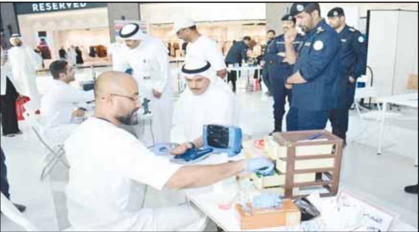
Ahmadi Governor Sheikh Hamoud Jaber Al-Sabah undergoes the necessary tests for blood donation during the campaign.