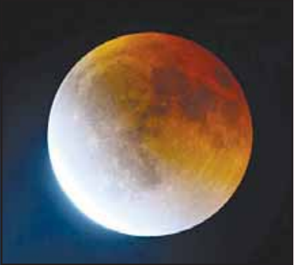
‘Blood Moon’ category photo.