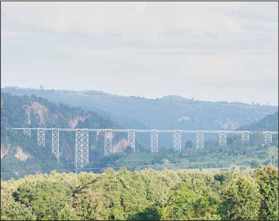
In this photo taken during a trip supervised by pro-military Myanmar media, the Goteik bridge is seen in Kawngkhio township, northern Shan State, Myanmar on Oct 10.