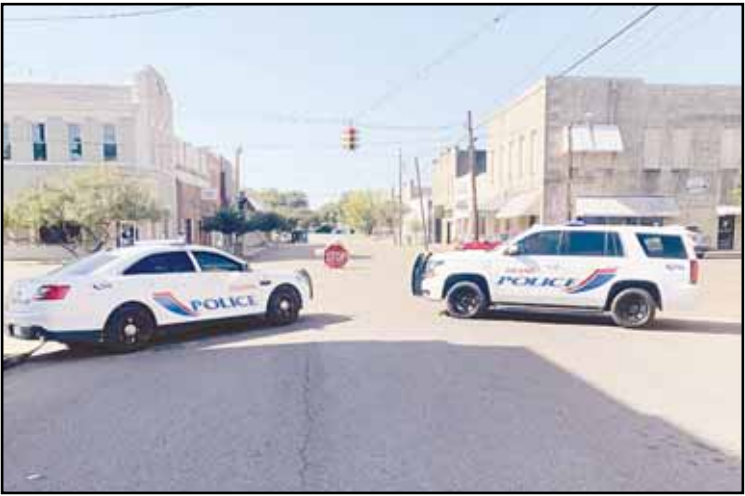
Police vehicles are parked after a deadly shooting Friday night in downtown Leland, Miss on Oct 11.