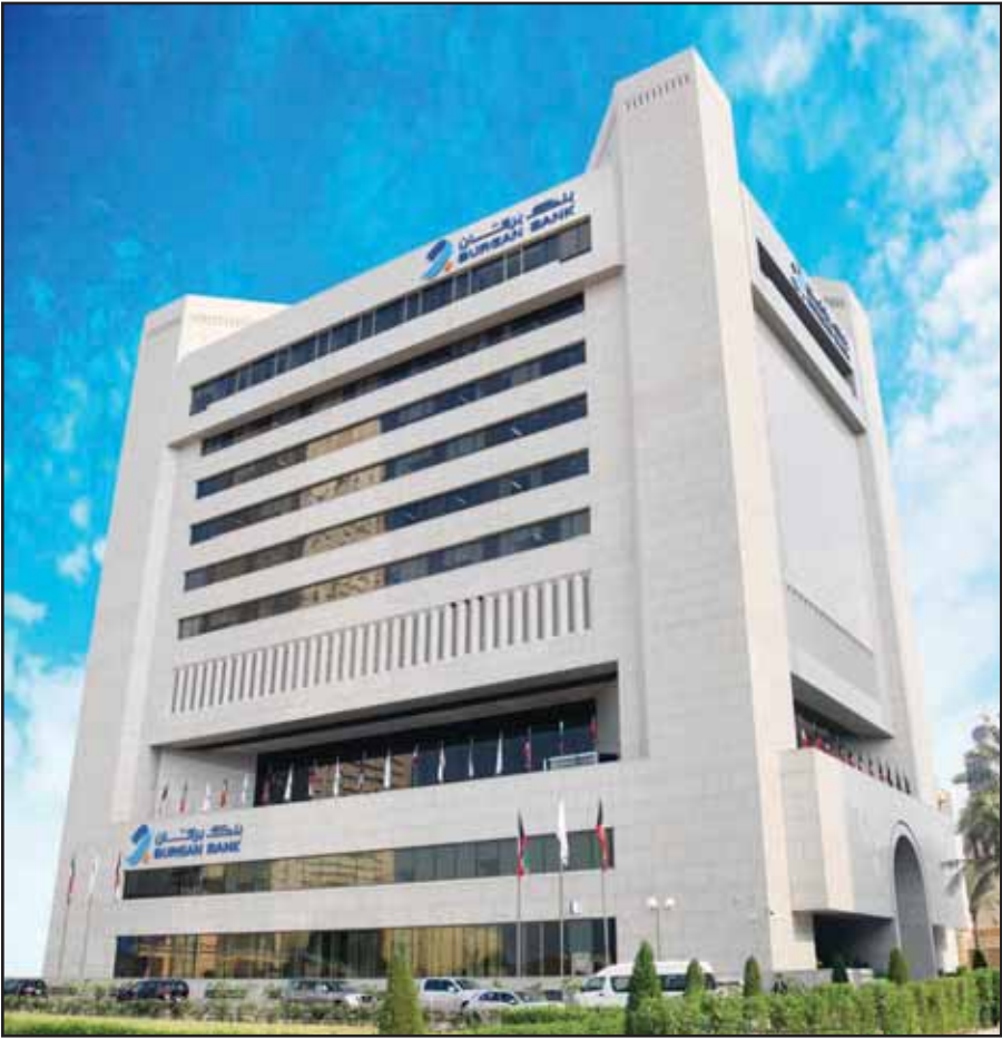
Burgan Bank headquarters

Established in 1977, Burgan Bank is a Kuwait-based conventional bank with a significant focus on the corporate and financial