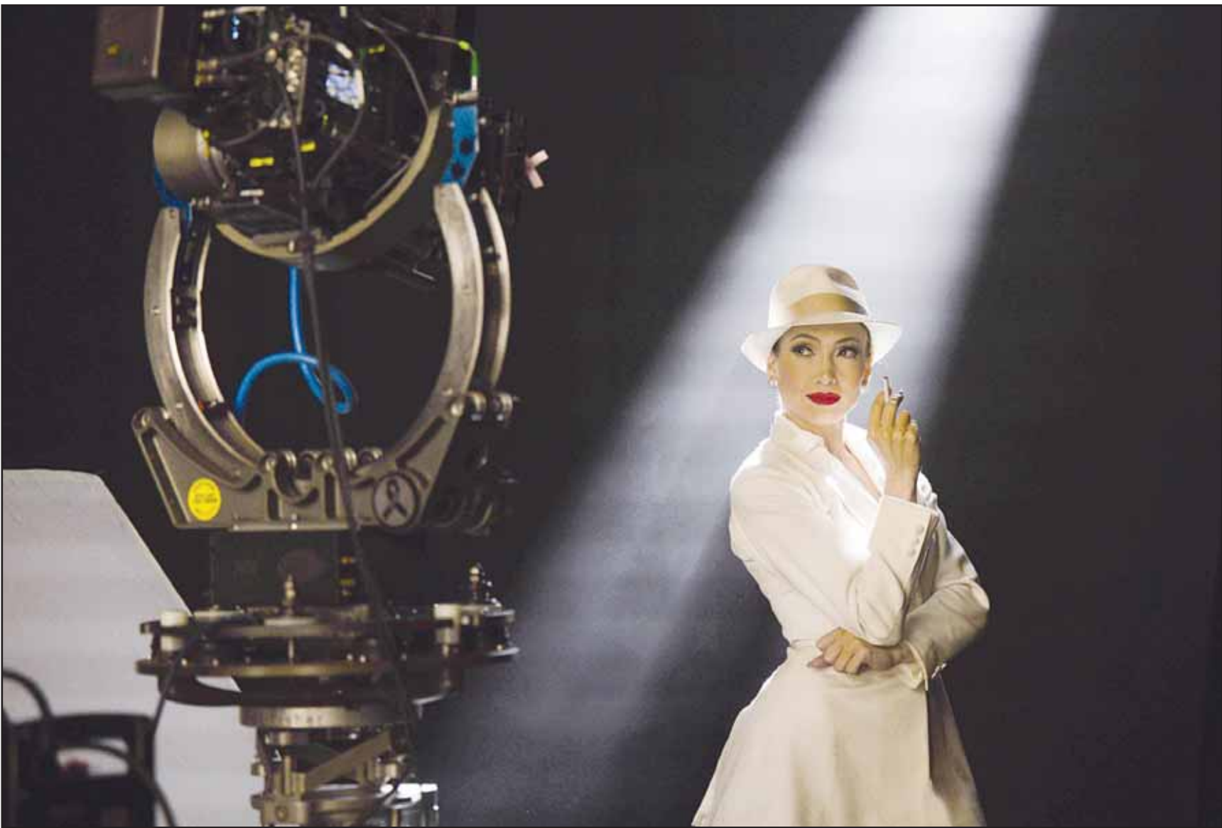
This image released by Roadside Attractions shows Jennifer Lopez in a scene from ‘Kiss Of The Spider Woman.’