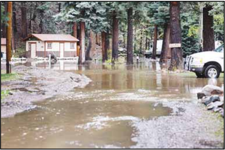
Flooding is seen near Vallecito Reservoir on Oct 11, 2025, near Bayfield, Colo.

The remnants of a tropical storm brought flooding across parts of the Southwest on Saturday, prompting hundreds of evacuations in southwestern Colorado as mountain streams raged above their banks and crews toiled to protect property with sandbags. Hardest-hit areas included Vallecito Creek, where almost 400 homes were under an evacuation order north of a reservoir 15 miles (24 kilometers) from the small tourist city of Durango. The Upper Pine River Fire Protection District urged people to