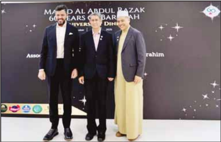
Kuwaiti Ambassador Ahmad Al-Shuraim with Singaporean Acting Minister-in-Charge of Muslim affairs Muhammad Ibrahim.

Meanwhile, a statement by the Kuwaiti Embassy revealed that the Abdulrazzaq Mosque, constructed in