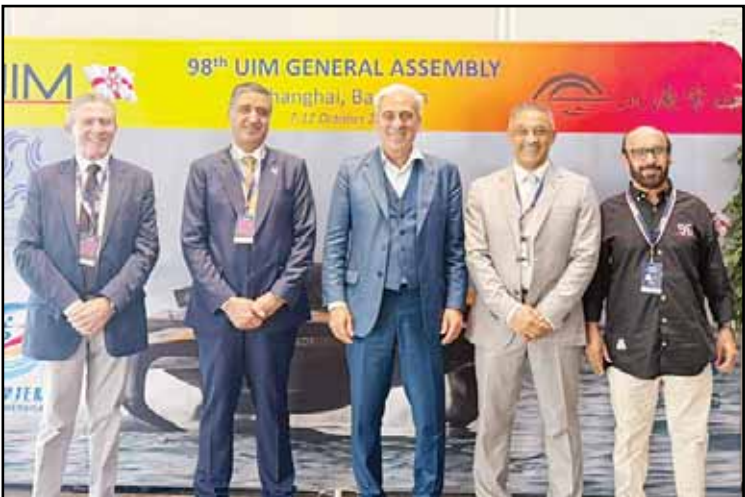
Officials pose for a group photo after the General Assembly in China.