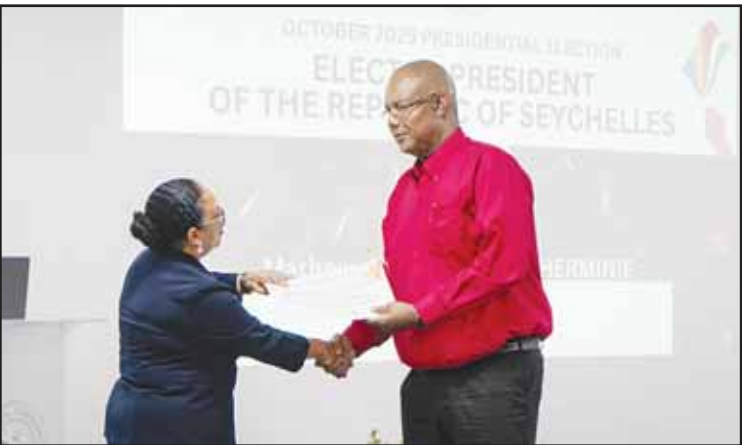
Patrick Herminie (right) is officially elected as the president of Seychelles in Victoria, Seychelles on Oct 12.

VICTORIA, Seychelles, Oct 12, (AP): Opposition leader Patrick Herminie won the presidential election in Seychelles, defeating incumbent leader Wavel Ramkalawan in a runoff vote, according to official results released early Sunday. Herminie garnered 52.7% of the vote, with Ramkalawan taking 47.3%, the results showed. Herminie represents the United Seychelles party, which led the country for four decades before it lost power in 2020. It was the governing party from 1977 to 2020. Ramkalawan, of the governing Linyon Demokratik Seselwa party, sought a second term. "The people have spoken," Herminie said in brief remarks after he was declared the president-elect. "I am deeply humbled by the trust the people have placed in me, and I formally accept this mandate with gratitude, a profound sense of duty and an unshakeable faith in the strength and character of the Seychellois people." Herminie served as speaker of the national assembly between 2007 and 2016. A majority of lawmakers in parliament will allow his party "to work collaboratively and constructively to deliver the best possible outcomes for our people," Herminie said. The race between the two main contenders in Seychelles' election was decided in a runoff after there was no outright winner in the presidential vote two weeks ago.