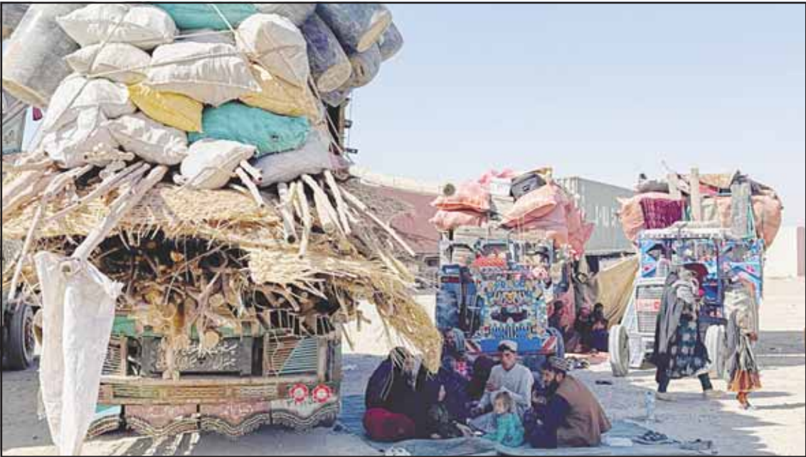
Afghan refugees sit next to their belongings loaded onto vehicles as they wait for opening of the border crossing point, which closed following Afghan and Pakistani security forces exchanged cross border firing, at a camp in Chaman, Pakistan on Oct 12.