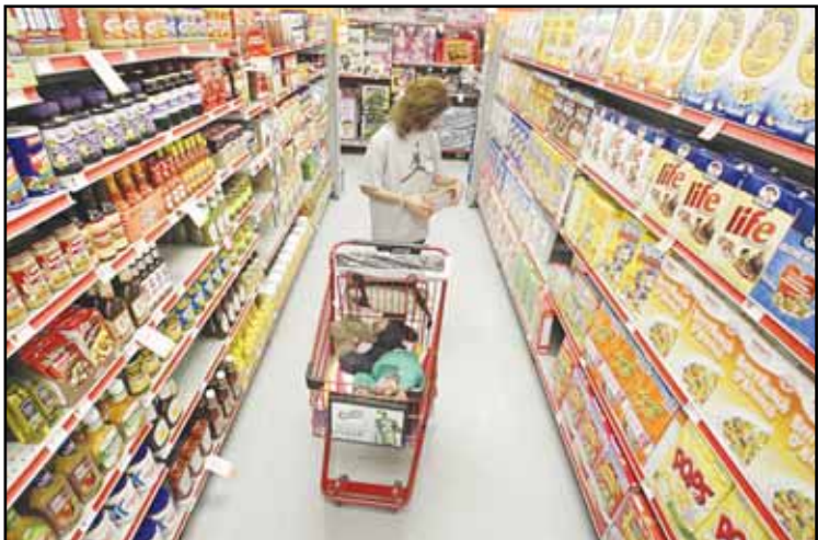
A woman looks at products in the aisle of a store as her daughter naps in a shopping cart in Waco, Texas on Dec 14, 2010.

People often joke that their favorite snack is “like crack” or call themselves “chocoholics” in jest. But can someone really be addicted to food in the same way they could be hooked on substances such as alcohol or nicotine? As an addiction psychiatrist and researcher with experience in treating eating disorders and obesity, I have been following the research in this field for the past few decades. I have written a textbook on food addiction, obesity and overeating disorders, and, more recently, a self-help book for people who have intense cravings and obsessions for some foods. While there is still some debate among psychologists and scientists, a consensus is emerging that food addiction is a real phenomenon. Hundreds of studies have confirmed that certain foods - often those that are high in sugar and ultraprocessed - affect the brains and behavior of certain people similarly to other addictive substances such as nicotine. Still, many questions remain about which foods are addictive, which people are most susceptible to this addiction and why. There are also questions as to how this condition compares to other substance addictions and whether the same treatments could work for patients struggling with any kind of addiction.