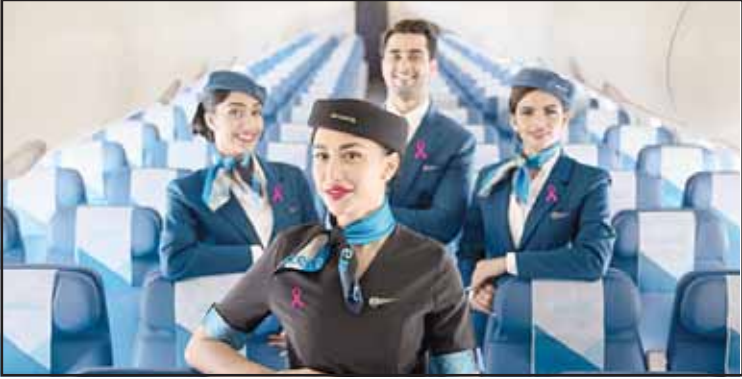
Jazeera Airways cabin crew

For bookings and more information, visit www.jazeeraairways.com , the Jazeera Airways mobile app or call 177.