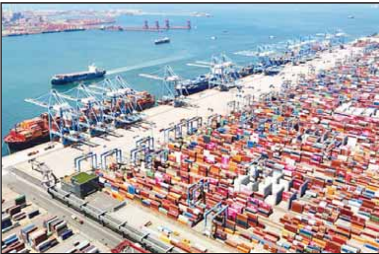
An aerial view of a container port is seen in Qingdao in east China’s Shandong province, on June 6, 2024.

“If the U.S. side obstinately insists on its practice, China will be sure to resolutely take corresponding measures to safeguard its legitimate rights and interests,” the post said.