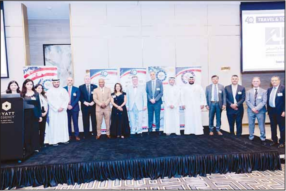
Group photo during the event.

To close the evening, a raffle added an element of fun and excitement. Prizes generously provided by AmCham partners included dining vouchers from Best Al Yousifi, and Crowne Plaza Farwaniya, which offered vouchers for two at both Al Noukhaza Restaurant and Al Shabestan Restaurant. Holiday Inn Salmiya contributed a Friday Brunch for two at Al Diwan Restaurant, a one-day weekend pass