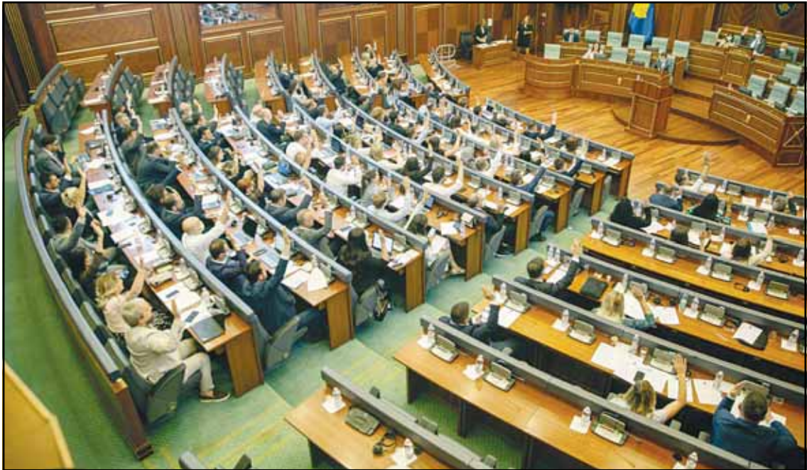
Kosovo lawmakers during a parliament session in Pristina, Kosovo on July 7, 2021.

The court also said there was evidence Sarkozy endorsed meetings between Guéant, then his chief of staff, and an intermediary able to provide secret financial arrangements.