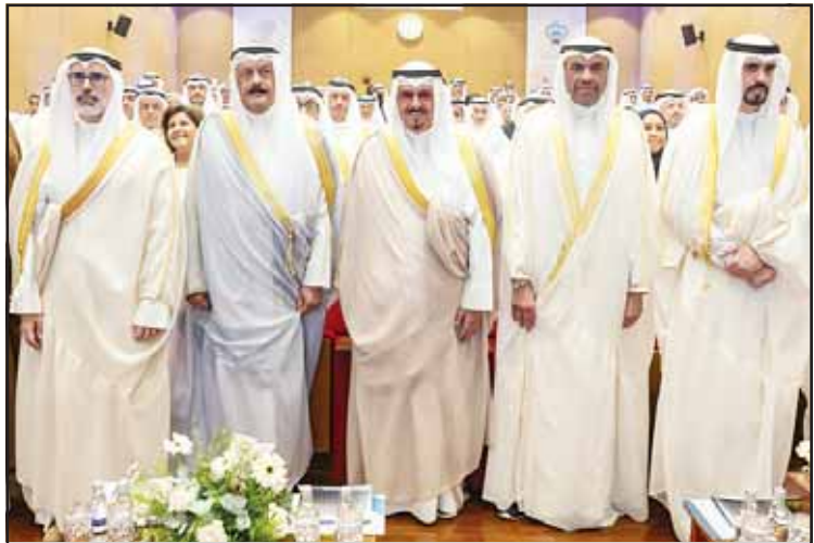
His Highness the Prime Minister Sheikh Ahmad Abdullah Al-Ahmad Al-Sabah and senior government officials.