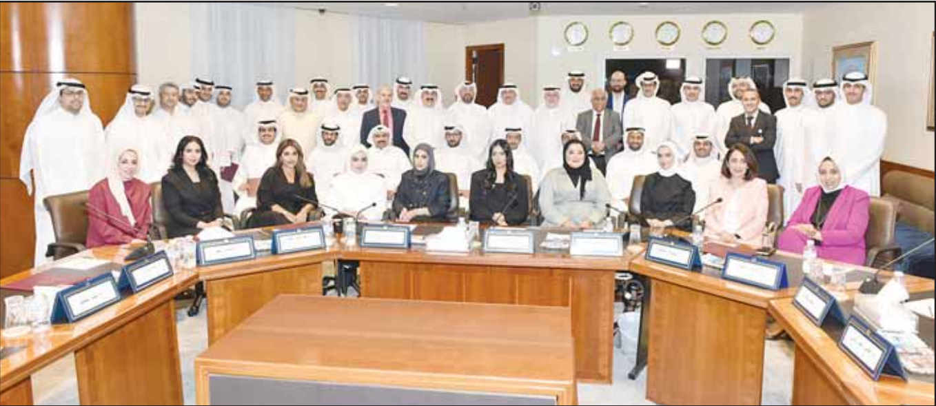
The third batch of the 'Newly Recruited Candidates Qualification and Training' project.

At the conclusion of the program, certificates were awarded to the trainees, and a select group of national lecturers were honored for their contributions to the program's success. This program is part of a series of initiatives launched by the Abdulaziz Hamad Al-Saqr Center for Development and Advancement to empower and qualify national cadres. Abdulaziz Hamad Al-Saqr Center for Development and Advancement is a non-profit organization specializing in short-term and long-term training programs in economics, commerce, management, technology, and insurance. It also offers international programs that provide certificates accredited by regulatory authorities in Kuwait, supporting sustainable development and meeting the needs of the private sector.