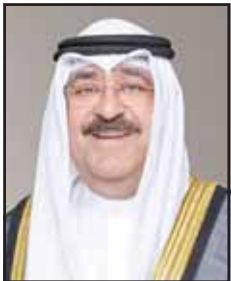
HH the Amir