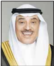
HH the Crown Prince