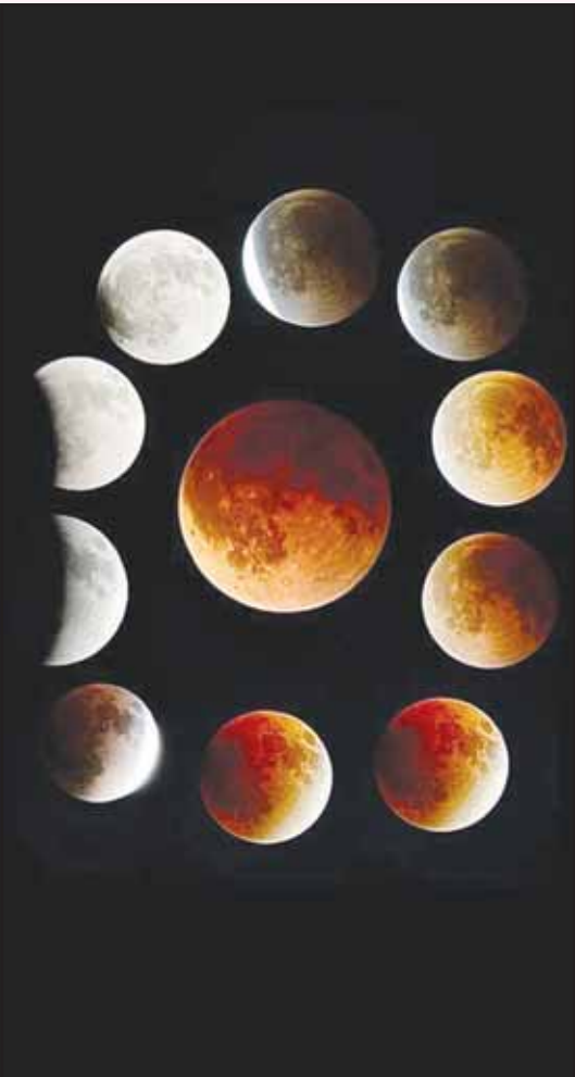
‘Lunar Eclipse Phases’ category photo.

The Al-Ojairi Scientific Center announced Saturday that six photographers from Kuwait and the Gulf region won top spots in the Arab Astronomy Photography Competition. The competition was held under the Center’s patronage in cooperation with the Kuwait Foun-