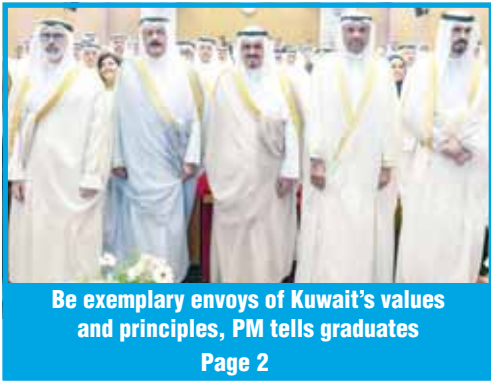
Be exemplary envoys of Kuwait's values and principles, PM tells graduates Page 2