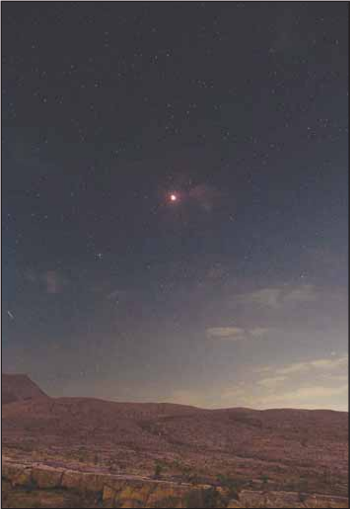
A photo in the ‘Lunar Eclipse with Landscape’ category.