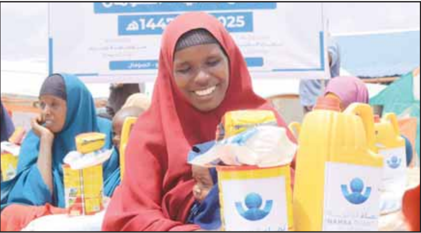
Kuwait's Namaa Charity distributes food aid to residents of the Garsbale camp in Somalia.

awareness of the vital role blood donation plays in saving lives. He praised the efforts of the participating bodies and volunteers for their cooperation in making the campaign a success. He also expressed his gratitude to all supporting entities, most notably the Ministry of Health, represented by the Blood Transfusion and Emergency Medical Services Departments, the Commercial Bank of Kuwait, the Tamdeen Group, The Warehouse Mall management, and other participating and supporting organizations, in recognition of their contribution to achieving the campaign's goals and enhancing the spirit of giving in the community.