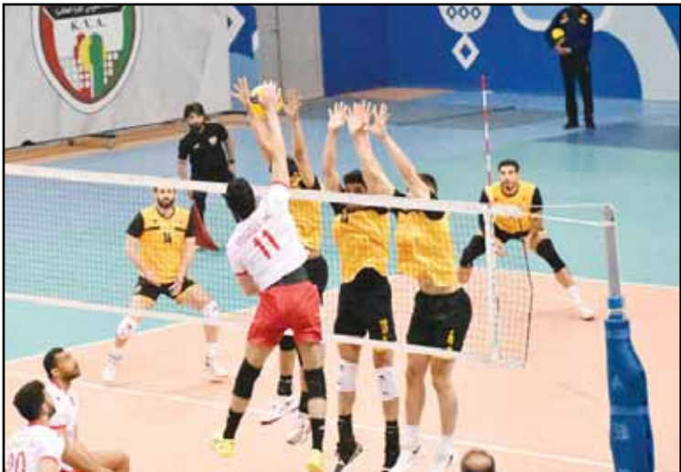
A Kuwait Club player takes a shot as Qadsia prepares to defend during the volleyball match.