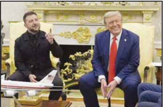
US President Donald Trump meets with Ukraine's President Volodymyr Zelenskyy in the Oval Office at the White House on Aug 18, in Washington.