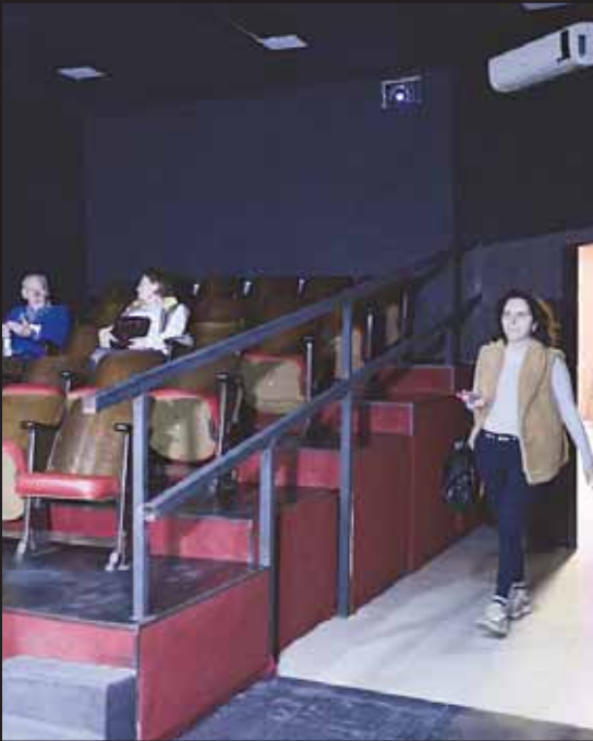
People waiting for a movie to start at the Cine LT3 built in an old parking garage in Sao Paulo, Thursday, Oct. 9, 2025.