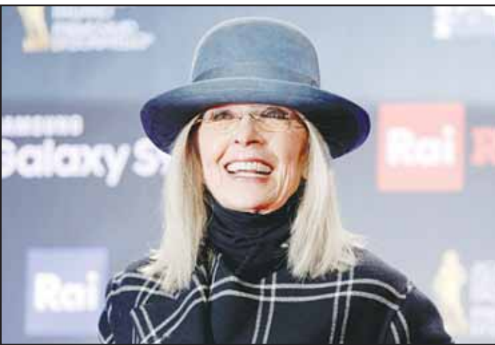
Diane Keaton appears at the David Donatello awards ceremony in Rome on March 21, 2018.

Keaton was born Diane Hall in January 1946 in Los Angeles. Her mother was a