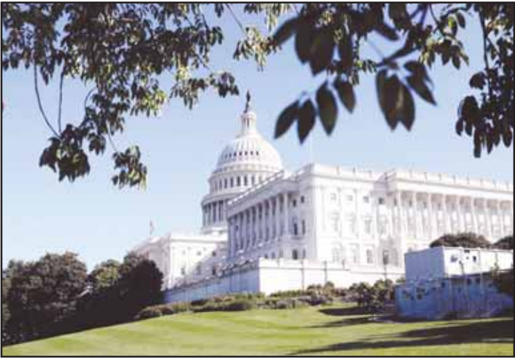
The US Capitol is photographed on Oct 10, in Washington.