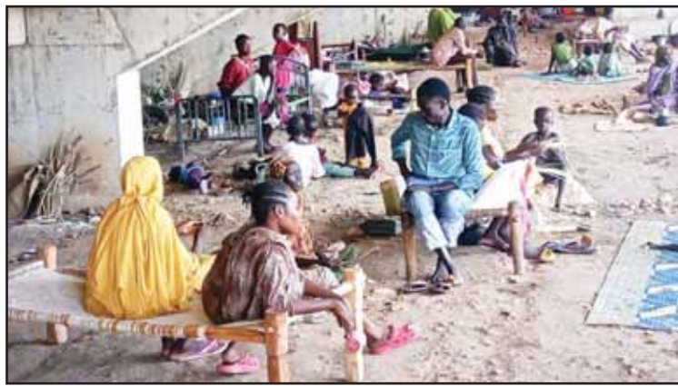
In this photo released by the NGO Mercy Corps, Sudanese families displaced by RSF attacks in Kordofan take shelter in a football stadium in Kadugli, South Kordofan province, Sudan on May 27.

The strike late Friday was the latest deadly attack on el-Fasher which has been for months the epicenter of the