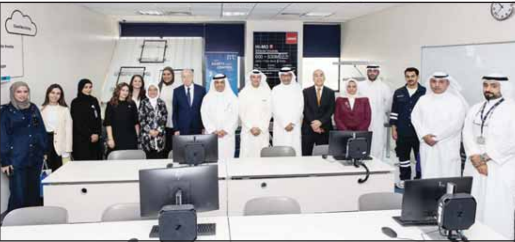
Group picture during the inauguration.