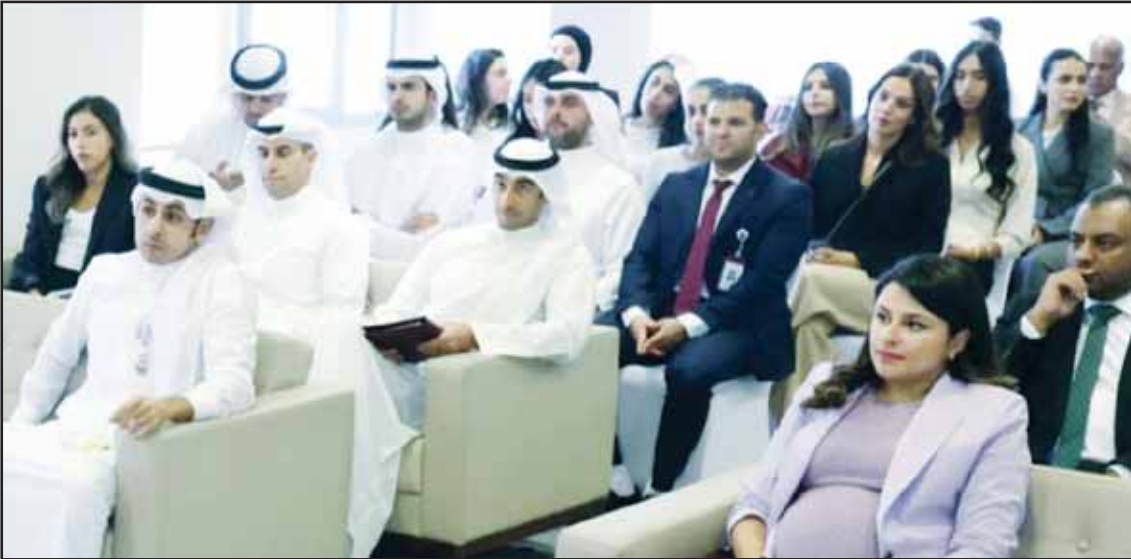
Part of the audience

and clients through its extensive expertise and strategic partnerships. Furthermore, the Board seeks to strengthen the principles of good governance and transparency across all company operations, ensuring sustainable performance and long-term positive results.