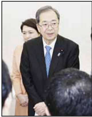
Tetsuo Saito, leader of Komeito, speaks to media after meeting newly-elected leader of the ruling Liberal Democratic Party Sanae Takaichi, on Oct 4 in Tokyo.

Saito said his party, which has been a coalition partner with the