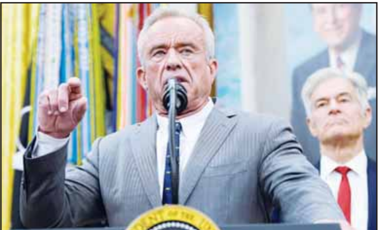
Health and Human Services Secretary Robert F. Kennedy Jr. speaks at Centers for Medicare & Medicaid Services administrator Dr. Mehmet Oz listens during an event with President Donald Trump in the Oval Office of the White House, Friday, Oct. 10, in Washington.

If you haven’t gotten your flu shot yet, now’s the time to protect yourself, and those you care for, this flu season.