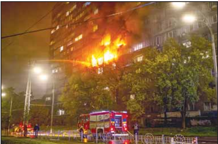
Emergency services personnel work to extinguish a fire following a Russian attack in Kyiv, Ukraine on Oct 10. (AP)

KYIV, Oct 11, (AP): Power was restored to over 800,000 residents in Kyiv on Saturday, a day after Russia launched major attacks on the Ukrainian power grid that caused blackouts across much of the country, and European leaders agreed to proceed toward using hundreds of billions of frozen Russian assets to support Ukraine’s war effort. Ukraine’s largest private energy company, DTEK, said Saturday that “the main work to restore the power supply” had been completed, but that some localized outages were still affecting the Ukrainian capital following Friday’s “massive” Russian attacks. Russian drone and missile strikes wounded at least 20 people in Kyiv, damaged residential buildings and triggered blackouts across swaths of Ukraine early Friday. Prime Minister Yulia Svyrydenko described the attack as “one of the largest concentrated strikes” against Ukraine’s energy infrastructure. Russia’s Defense Ministry on Friday said the strikes had targeted energy facilities supplying Ukraine’s military. It did not give details of those facilities, but said Russian forces used Kinzhal hypersonic missiles and strike drones against them.