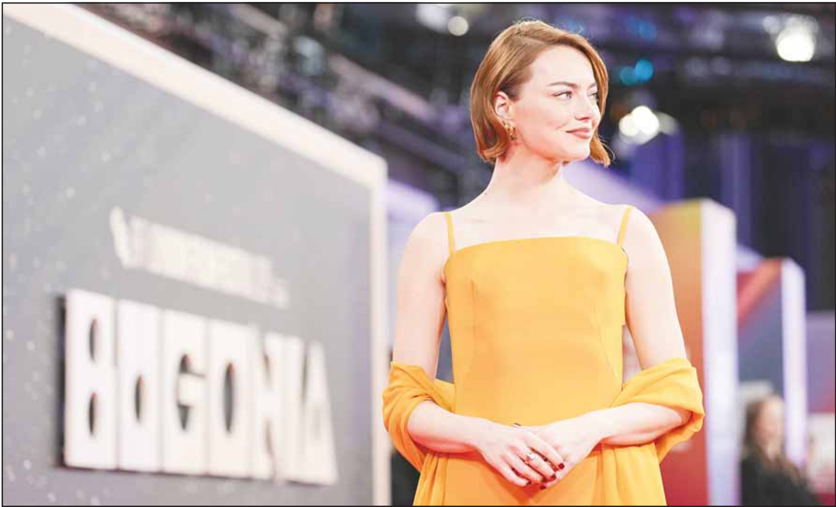
Emma Stone poses for photographers upon arrival at the premiere of the film 'Bugonia' during the London film festival in London, Friday, Oct. 10.