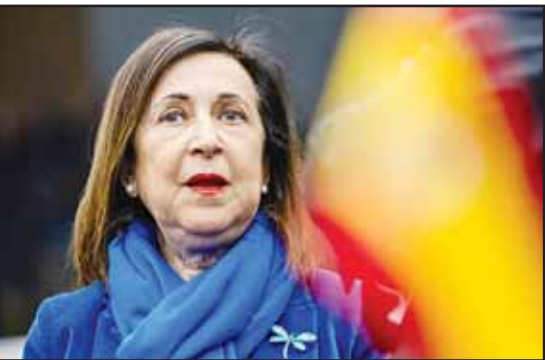
Spain’s Defense Minister Margarita Robles arrives for a meeting of the Ukraine Defence Contact Group at NATO headquarters in Brussels on April 11.

WASHINGTON, Oct 11, (Agencies): U.S. President Donald Trump suggested that Spain be expelled from NATO for refusing to increase its defense spending. “They have no excuse not to do this,” Trump told reporters at the White House during a meeting with visiting Finnish President Alexander Stubb. “Maybe you should throw them out of NATO frankly.” “You people are gonna have to start speaking to Spain,” Trump said. “You have to call them and find why are they a laggard.” Under pressure from Trump, NATO members in June agreed to raise their military spending to 5 percent of gross domestic product by 2035. Spanish Prime Minister Pedro Sanchez rejected the target, calling it “incompatible with our welfare state and our world vision.” Spain’s defense minister has defended her country’s commitment to NATO after Trump floated the idea that the southern European country should be expelled from the military alliance for not spending enough on its armed forces. In comments made while meeting with F Stubb in the Oval Office, Trump said that Spain was a “laggard” and must be pressed to spend more on its military. Trump was referring to Spain being the sole member of the 32-nation alliance not to commit to increasing military spending to 5% of GDP in an agreement reached in June.