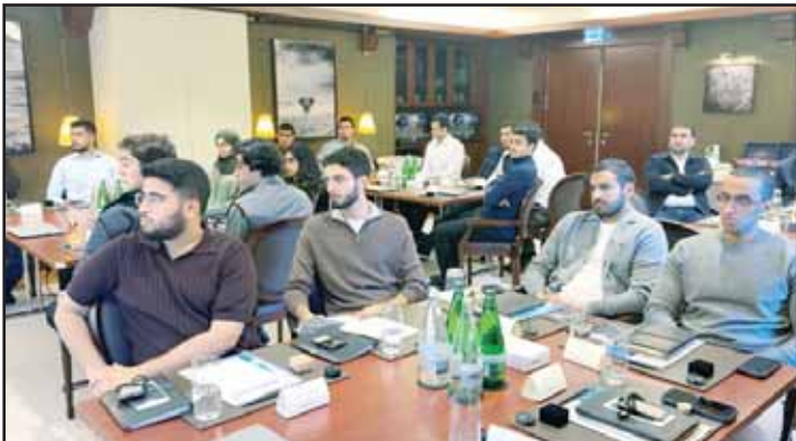
Program participants during one of the discussion sessions.

town of Gstaad, renowned for its tranquil charm and picturesque landscapes, offering moments of reflection and relaxation.