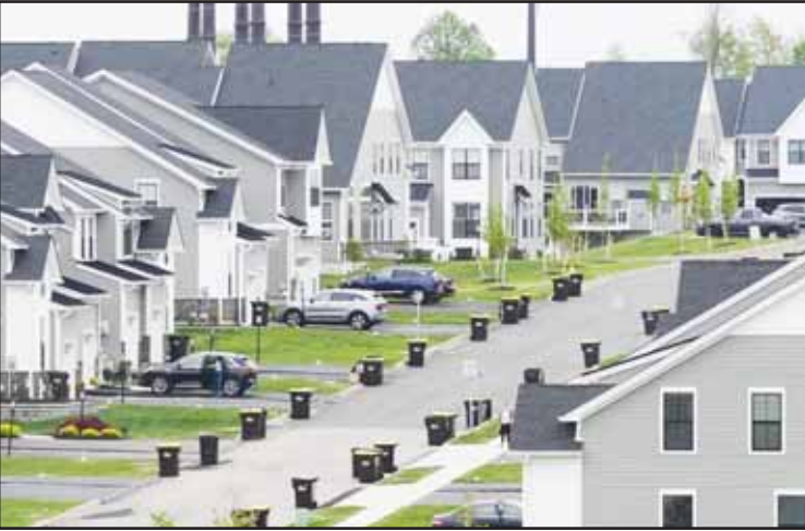
A development of new homes in Eagleville, Pa., is shown on April 28, 2023.

mean mortgage rates will keep declining. Last fall, after the Fed cut its rate for the first time in more than four years, mortgage rates marched higher, eventually reaching just above 7% in January this year. The average rate on a 30-year mortgage has stayed above 6% since September 2022, the year mortgage rates began climbing from historic lows. The housing