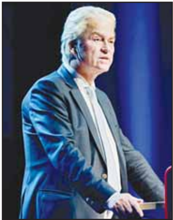
Dutch politician Geert Wilders speaks at the Danish People’s Party annual meeting, in Tinghallen, Viborg, Denmark on Sept 27.

BRUSSELS, Oct 11, Dutch far-right politician Geert Wilders said Friday that he’s suspending campaigning for national elections later this month following reports that he was a possible target of a suspected plot in Belgium to kill politicians using a drone carrying explosives. Three men were taken into custody after searches of their homes in the port city of Antwerp by police using explosives sniffer dogs. A homemade bomb was found at one home, but it wasn’t operational at the time, prosecutors said. A bag of steel balls also was found there, while a 3D printer believed to be used to make parts for the planned attack was found at another residence. Prosecutors said it appeared “that the intention was to build a drone to attach a load.” Prosecutors said the police raids