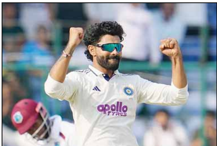
India’s Ravindra Jadeja celebrates the dismissal of West Indies’ Tagnarine Chanderpaul on the second day of the second cricket test match between India and West Indies at the Arun Jaitley Stadium in New Delhi, India.

Jurel was bowled in the 135th over - with Gill declaring immediately.