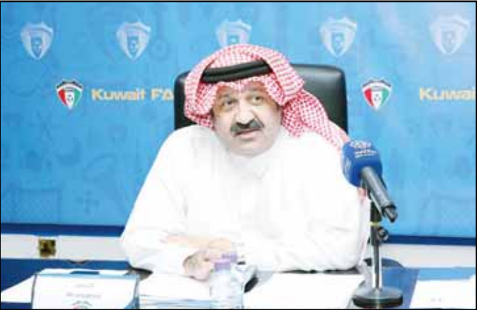
Sheikh Ahmad Al-You-suf Al-Sabah, President of the Kuwait Football Association will be attended by FIFA President Gianni Infantino.