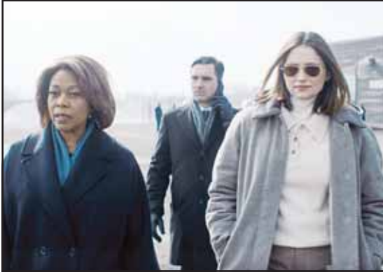
This image released by Apple TV+ shows, (from left), Alfre Woodard, Gray Powell and Haley Bennett in a scene from 'The Last Frontier.'

"It sets a mindset that you've got to be switched on right from the beginning because you've got to wear the right gear, you've got to protect yourself, you've got to get ready