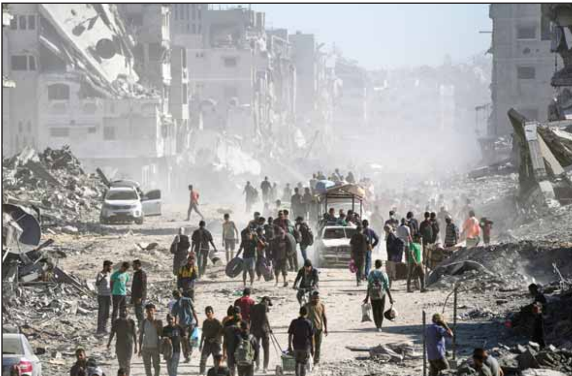
Displaced Palestinians carry their belongings as they walk along the heavily damaged Al-Jalaa Street in Gaza City, Saturday, Oct. 11, 2025, after Israel and Hamas agreed to a pause in their war and the release of the remaining hostages.