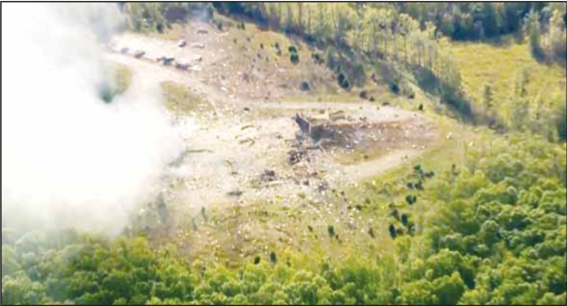
Smoke fills the air as debris covers the ground and vehicles after a powerful blast ripped through a military explosives manufacturing plant in Hickman County, Tenn. on Oct 10.