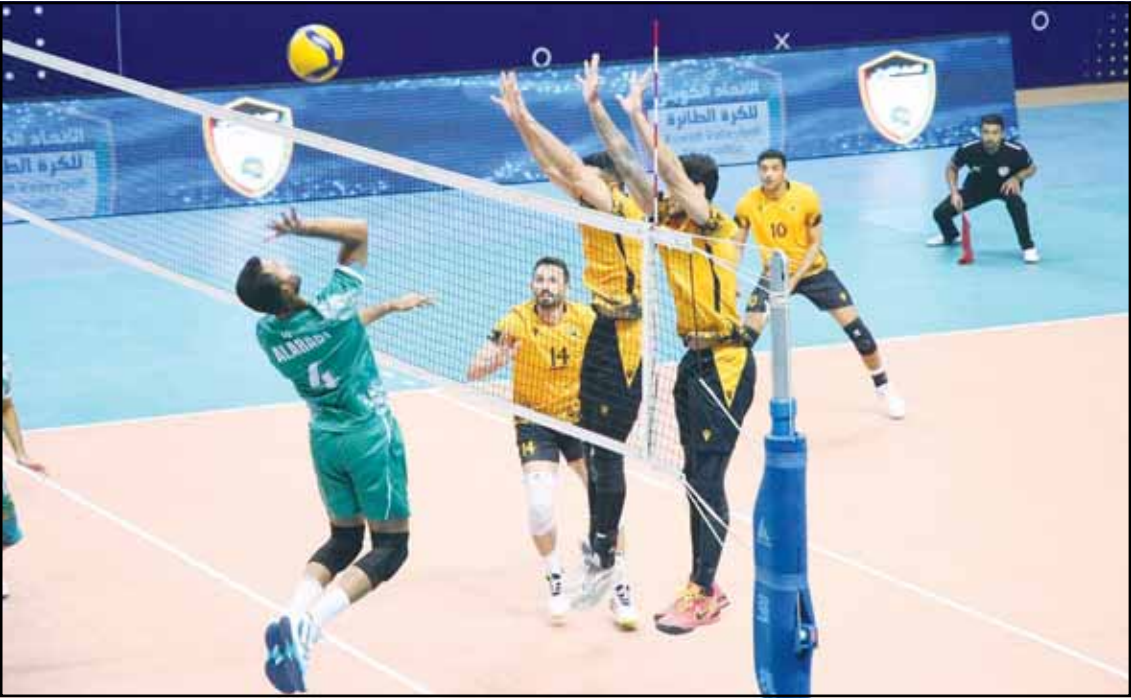
Al Arabi player strikes as a Qadsia player moves in for the block.

By Khaled Al-Enezi Al-Seyassah/Arab Times Staff