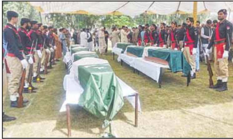
Officials and others attend funeral prayers of police officers, who were killed when gunmen attacked a police training center, in Dera Ismail Khan in northwestern Pakistan, on Oct 11.

The gun battle between police and militants lasted nearly six hours. Seven police personnel were killed and 13 were injured, Ahmad said.