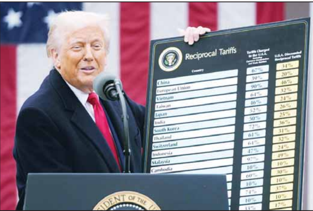
President Donald Trump speaks during an event to announce new tariffs, April 2, 2025, in the Rose Garden at the White House in Washington.

While Trump’s wording was definitive, he is also famously known for backing down from threats. Ear-