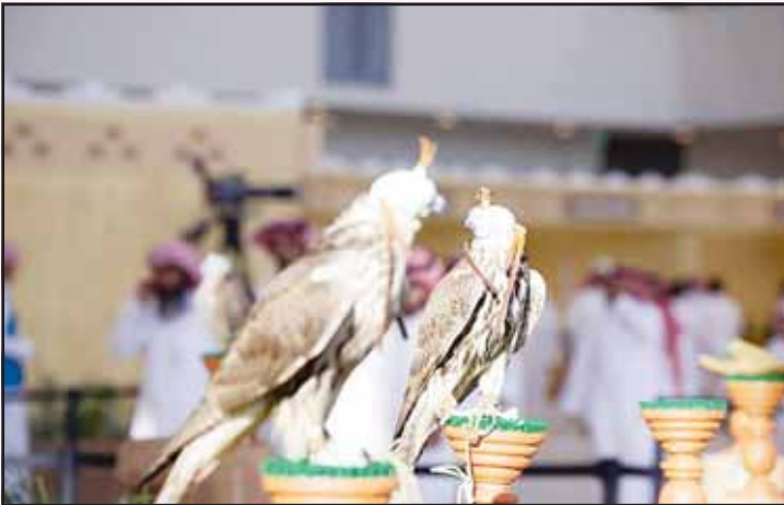
A section showcasing rare falcon displays and auctions at the exhibition.