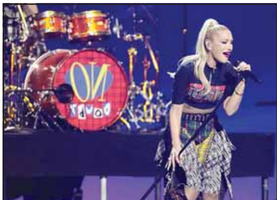
Gwen Stefani of No Doubt performs during the FireAid benefit concert in Inglewood, Calif., on Jan. 30, 2025.

"I can't wait to get on stage again with my bandmates. There is a beautiful energy that happens when we play together, an electricity I have felt through all of our years," bassist Tony Kanal said in a statement. "To be able to leave it all on the table each night and take our fans on the insane journey that is Sphere is beyond our wildest dreams. See you in May!"