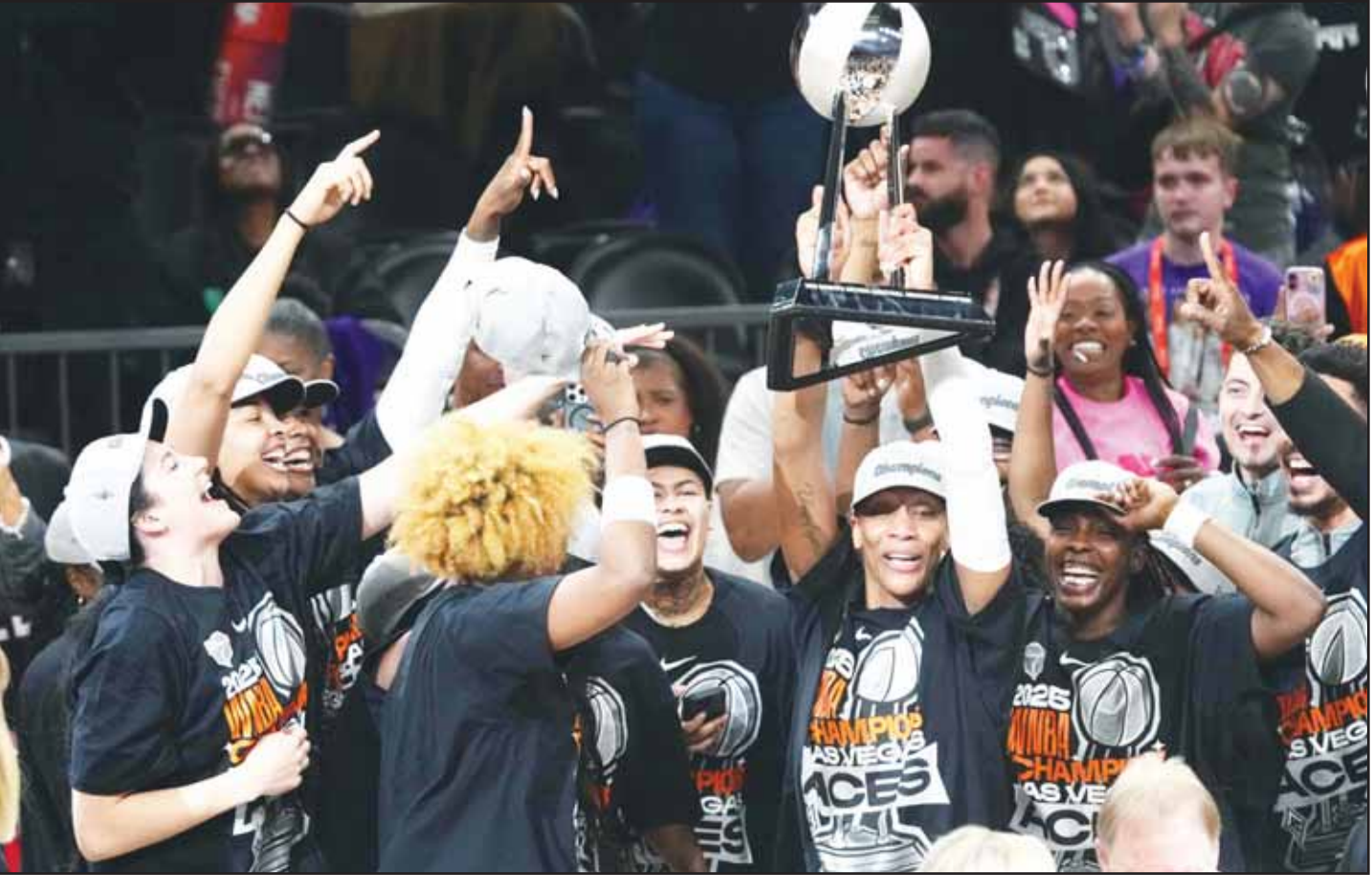
Las Vegas Aces center A'ja Wilson holds up the championship trophy after defeating the Las Vegas Aces in Game 4 of the WNBA basketball finals in Phoenix.