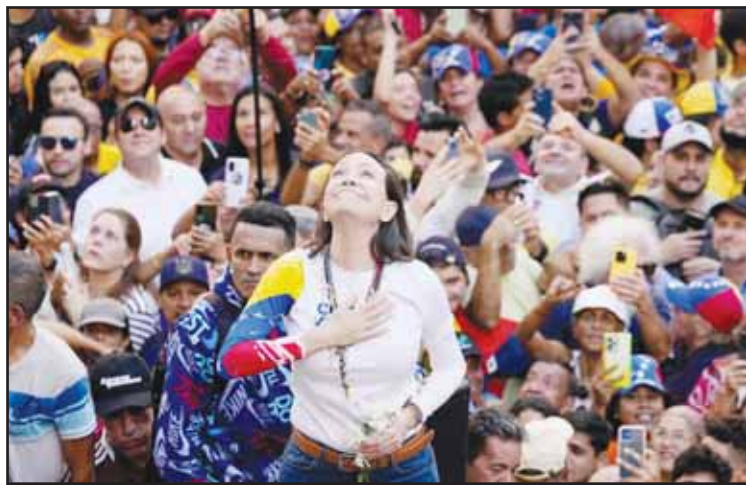
Venezuelan opposition leader Maria Corina Machado addresses supporters at a protest against President Nicolas Maduro in Caracas, Venezuela on Jan 9, the day before his inauguration for a third term.

"This is something that the Venezuelan people deserve," Machado said in a call with the Norwegian Nobel Institute. "I am just part of a huge movement. ... I'm humbled, I'm grateful and I'm honored not only by this recognition, but I'm honored to be part of what's going on in Venezuela today."