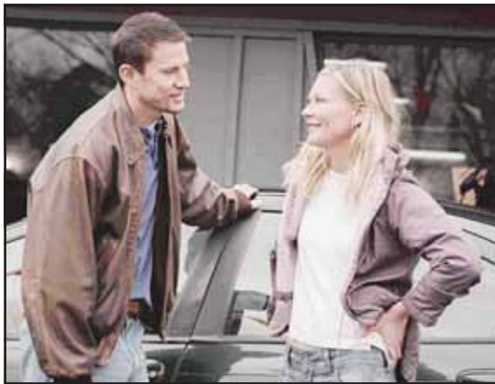
This image released by Paramount Pictures shows Channing Tatum, (left), and Kirsten Dunst in a scene from 'Roofman.'

Tatum is really good at making you immediately em-