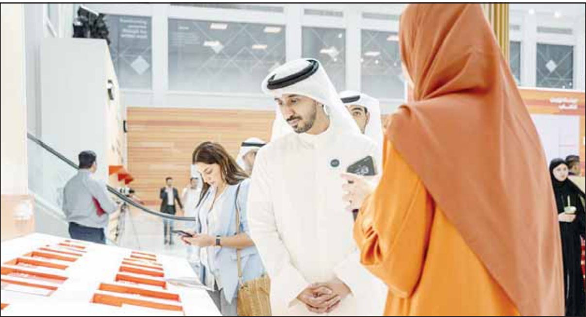
The 44th Sharjah International Book Fair (SIBF 2025) will run from November 5-16 at Expo Centre Sharjah under the theme 'Between You and a Book.' A photo taken during the SIBF 2025 press conference.