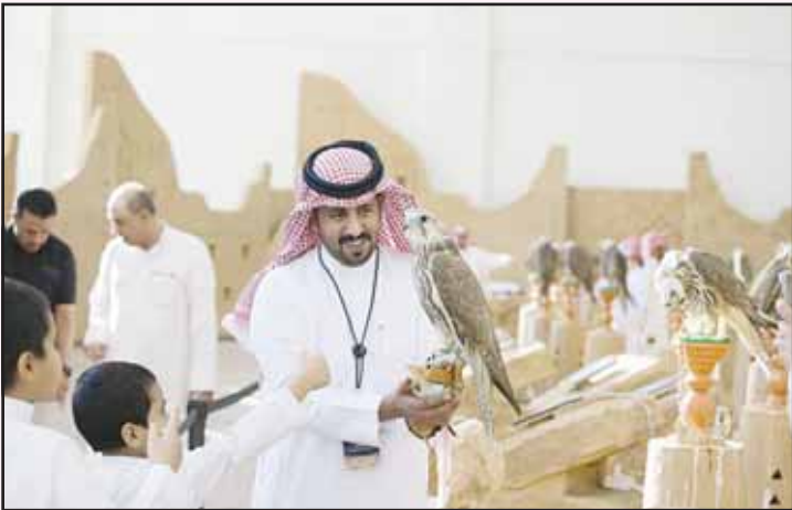
A view of the Falcons and Hunting Exhibition, organized by the Saudi Falcons Club in Malham, north of Riyadh.