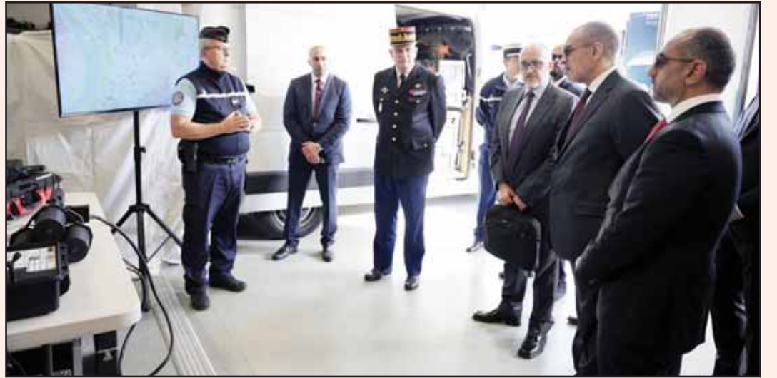
Kuwait's First Deputy Prime Minister and Interior Minister during his visit to the southeastern region of the French gendarmerie.