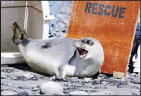
A hooded seal is released March 30, 2008, by the University of New England’s Marine Animal Rehabilitation Center in Biddeford, Maine.

Because all the marine mammals native to the Arctic – seals, whales and polar bears – rely on the habitat provided by sea ice, they’re all at risk as it diminishes because of human-caused climate change, said Kit Kovacs, co-chair of IUCN’s Species Survival Com-