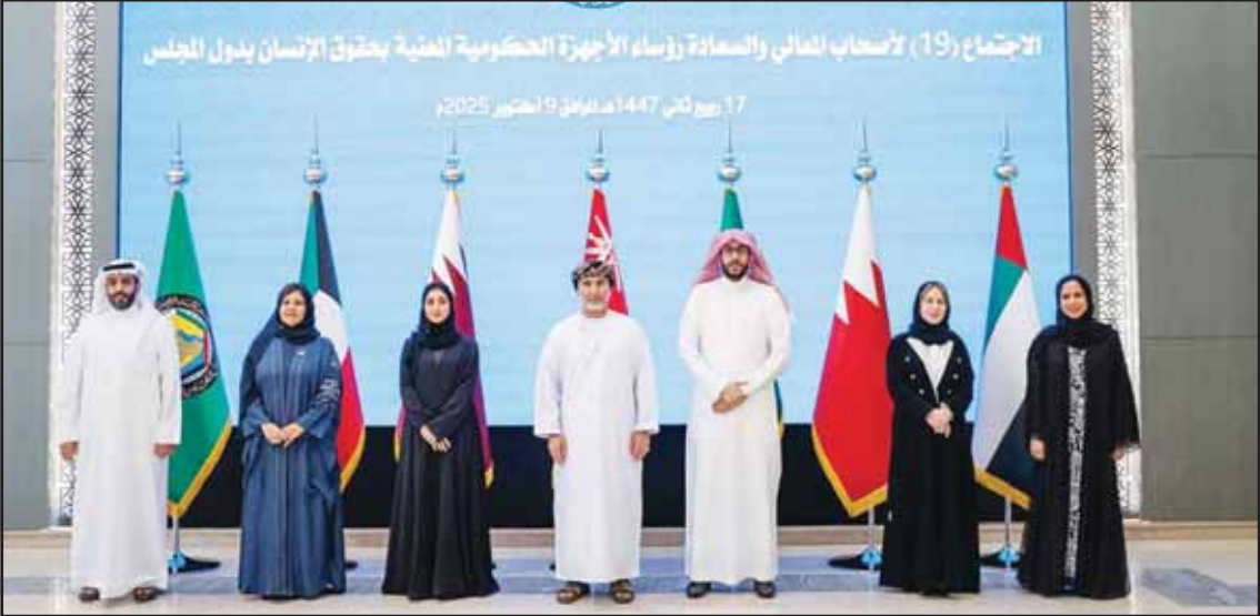
Participants of the 19th meeting of GCC government bodies tasked with human rights.

With a declared famine still underway in parts of the strip, UNICEF has 1,300 trucks ready to enter, with more on the way, Ingram said. The aid is among the 170,000 metric tons that have been positioned in neighboring countries awaiting permission from Israel to restart deliveries that have been suspended. The days since the announcement of the ceasefire have moved swiftly. Israel's military confirmed it had taken effect Friday and said the 48 hostages still in Gaza would be freed Monday. A U.N. official, speaking on condition of anonymity to discuss details not yet public, said Israel also approved expanded aid deliveries starting Sunday.