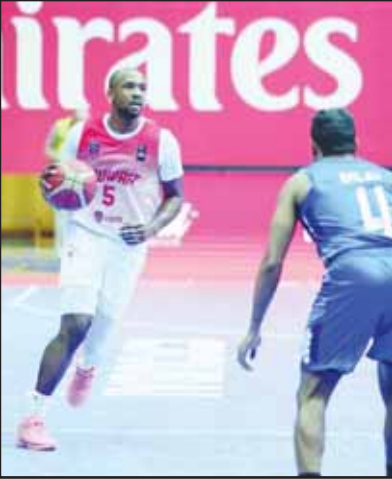
A Kuwait Club player controls the ball as the opponent moves in to defend. a positive start in today's opener. The second match promises a tough contest between Qadsia and Kazma, both of whom recently competed in the Arab Championship. Qadsia was eliminated in the round of 16 by Al-Manama of Bahrain, while Kazma finished fourth, falling to Al-Arabi of Qatar in the third-place playoff.