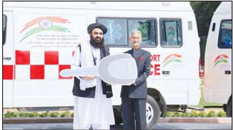
This photograph shared by Indian External Affairs Minister S. Jaishankar, on the X platform shows him, right, handing over a symbolic key after making a gift of ambulances to Afghan Foreign Minister Amir Khan Muttaqi in New Delhi, India on Oct 10.

Muttaqi, who is among multiple Afghan Taleban leaders under UN sanctions that include travel bans and asset freezes, arrived in New Delhi on Thursday after the UN Security Council Committee granted him a