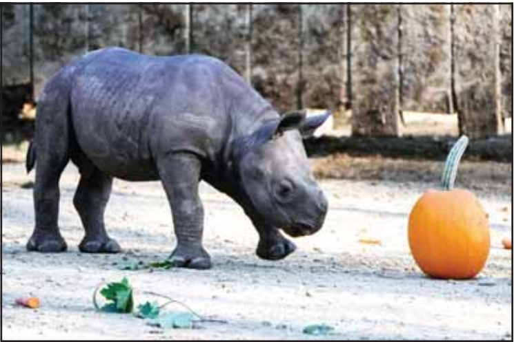
A male Eastern Black Rhino calf born Sept. 13, 2025, approaches a pumpkin Friday, Oct. 10, as he makes his public debut at the Cleveland Metroparks Zoo in Cleveland, Ohio.

“We are strengthening strategies to prevent the occurrence of malaria and epidemics, as well as serious health impacts on the population,” he added, calling on all multisectoral authorities, from environmental services to municipalities, to take part and to care for themselves and their communities.