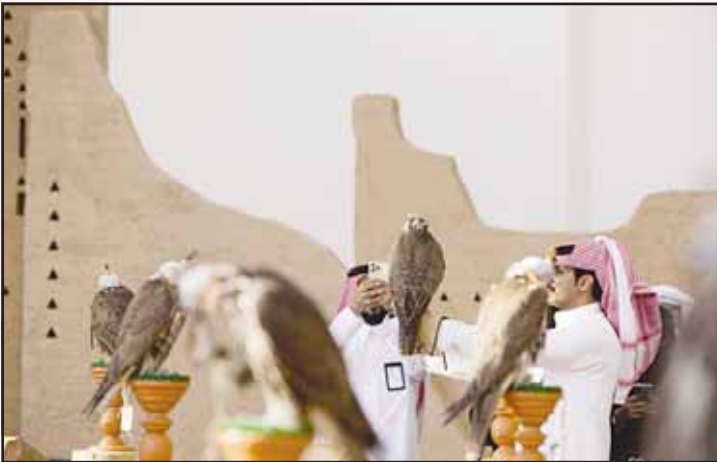
Falcons and Hunting Exhibition organized by the Saudi Falcons Club in Malham, north of Riyadh.