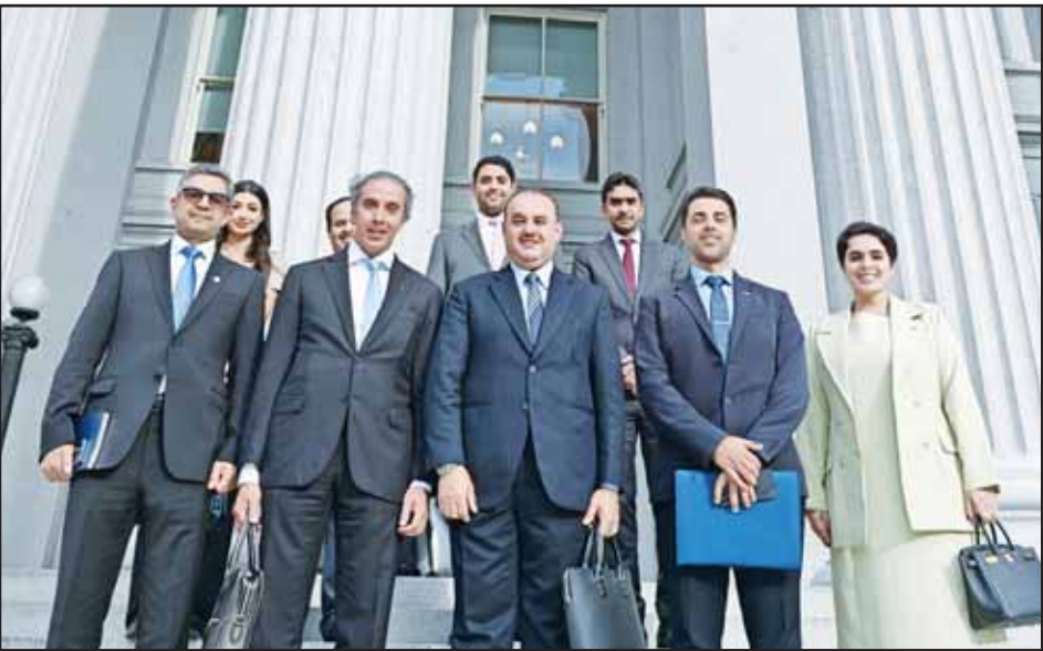
Kuwait's Financial Intelligence Unit delegation with US Treasury officials.