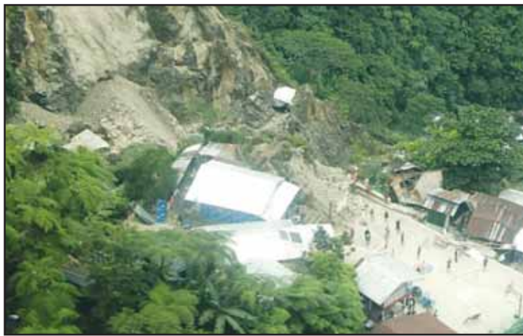
In this photo provided by the 10ID DPAO, Philippine Army, residents stand beside a landslide, triggered by a strong earthquake, hit an area at Pantukan town, Davao de Oro province, southern Philippines on Oct 10. (AP)

The first quake was centered at sea about 43 kilometers (27 miles) east of