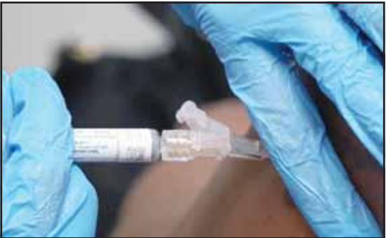
A pharmacist gives a patient a flu shot in Miami on Sept 9, 2025.

Taken together, that means there could be a significant