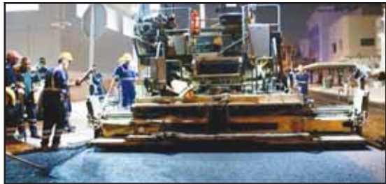
MPW workers laying asphalt on Faiha roads.