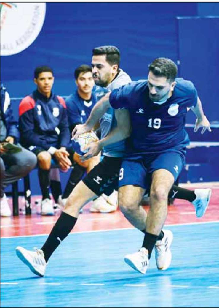
Highlights from last season's preseason tournament.

KUWAIT CITY, Oct 11: The 2025-2026 handball preseason tournament will get underway on October 20 at the Sheikh Saad Al-Abdullah Sports Complex, featuring three opening-round matchups. The schedule includes Yarmouk vs. Sulaibikhat at 4:30 p.m., followed by Arabi vs. Nasr at 6:00 p.m., and concluding with Salmiya vs. Fahaheel at 7:00 p.m. The Kuwait Handball Premier League is currently on pause after completing the first round of the second stage, allowing the national team to prepare for upcoming events — the Islamic Solidarity Games hosted by Saudi Arabia from November 3, and the Asian Championship in Kuwait next January, which serves as a qualifier for the 2027 World Cup. The Kuwait Handball Federation announced the preseason competition to keep clubs active during the league break. Under the tournament format, all teams will compete in a single round-robin, with the top four sides advancing to the Golden Square (semifinals), played in a knockout format to determine the finalists. In a move aimed at promoting player development, the Competitions Committee has approved the participation of youth and junior players without any limit on numbers. This initiative is designed to give young talents valuable experience by playing alongside senior athletes, helping to enhance their skills and readiness for future age-group leagues and national competitions.