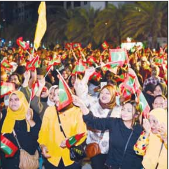
Opposition supporters wave Maldivian national flags during an anti-government protest in Male, Maldives on Oct 3.

Protesters called for a stop to restrictions on the use of decentralized power by island councils, withdrawal of a new law enabling fines and suspension or cancellation of media licenses and mismanagement of state enterprises.