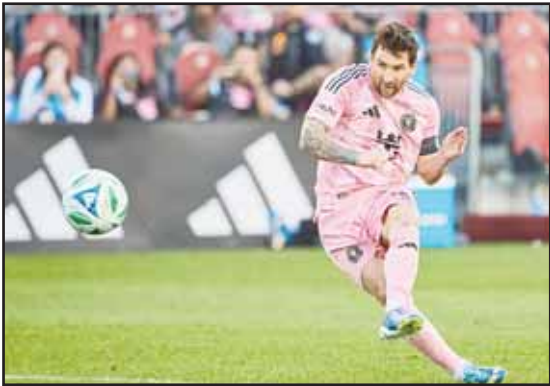
Inter Miami’s Lionel Messi (10) takes a free kick against Toronto FC during the second half of a MLS soccer game in Toronto.