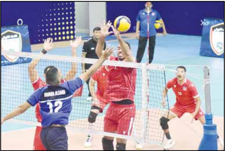
A Kuwait Club player spikes the ball during the game.