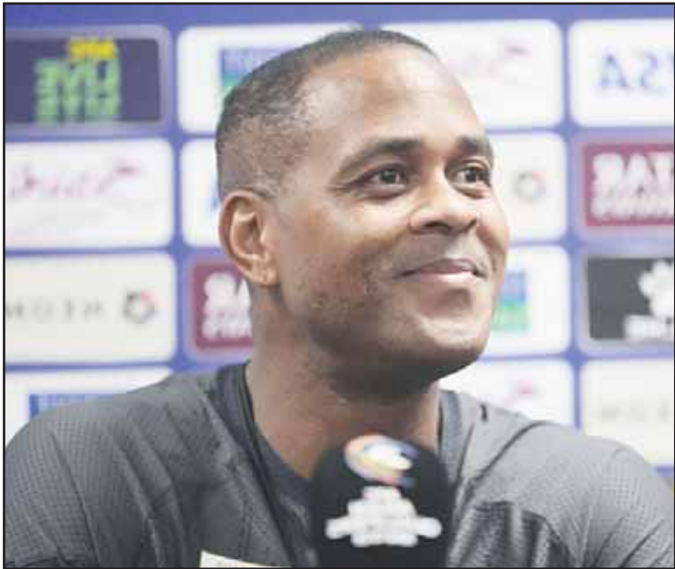
In this file photo, Indonesia's coach Patrick Kluivert speaks during a press conference ahead of the World Cup qualifying match against Australia at the Sydney Football Stadium in Sydney, Australia. (AP)

RIYADH, Oct 4, (AP): Almost 90 years after its first and only appearance at the World Cup, Indonesia is just two victories away from returning to the tournament. It would mark a major turnaround in fortunes in just over three years since 135 spectators died at the Kanjuruhan stadium disaster in East Java as tear gas fired by security forces caused a stampede for the exits on Oct. 1, 2022 in a domestic match. If Indonesia can defeat Saudi Arabia and Iraq on Oct. 8 and 11, respectively, in a qualifying tournament, then it will advance to 2026 World Cup to be co-hosted by the United States, Canada and Mexico. “It will be a tough match, but until some time ago no party might predict Indonesia will undergo two crucial matches to qualify for the World Cup,” FIFA president Gianni Infantino said last week. Infantino was behind the expansion of the World Cup from 32 teams in 2022 to 48 next year. Asia now has eight automatic places and Japan, South Korea, Australia, Iran, Uzbekistan and Jordan already qualified from the third round which ended in June. That leaves two more spots available for six other teams, divided into two groups of three in the qualifying tournament. The winner of each goes to the World Cup. Indonesia has been placed in