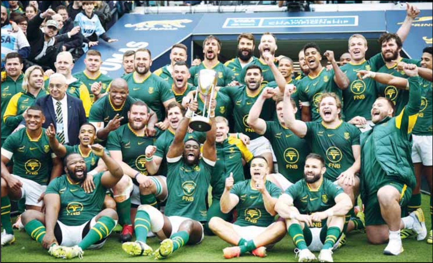
South Africa's Siya Kolisi, center, raises the trophy as they pose for photographers after winning the Rugby Championship match against Argentina at Twickenham stadium, in London.