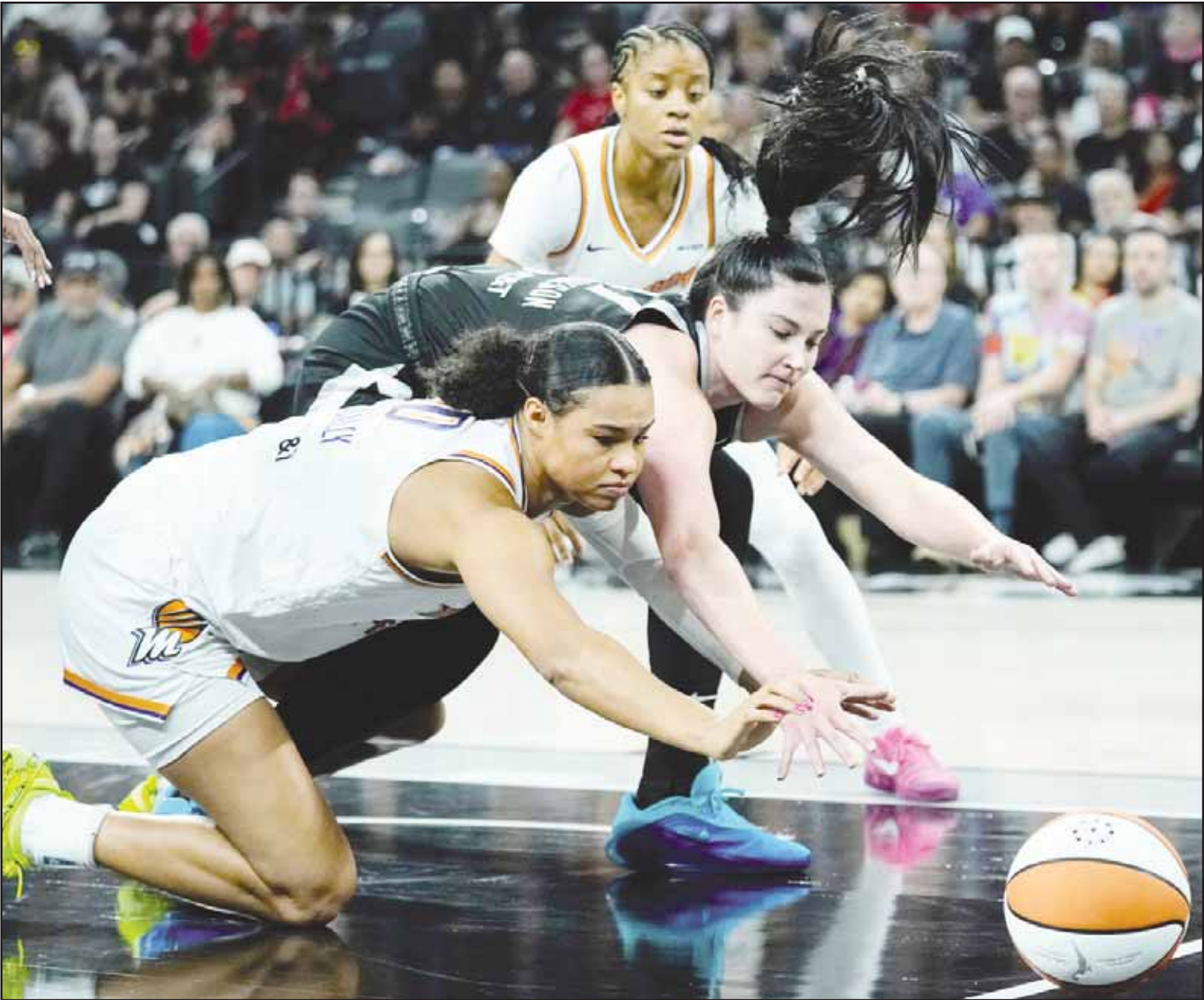
Phoenix Mercury forward Satou Sabally and Las Vegas Aces center Megan Gustafson, right, battle for a loose ball during the first half in Game 1 of a WNBA basketball final playoff series in Las Vegas.