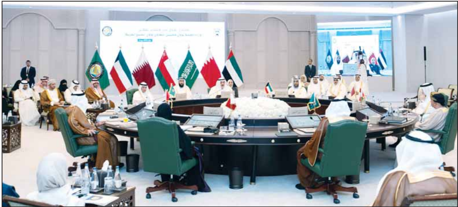
The 11th Meeting of the GCC Health Ministers' Committee.