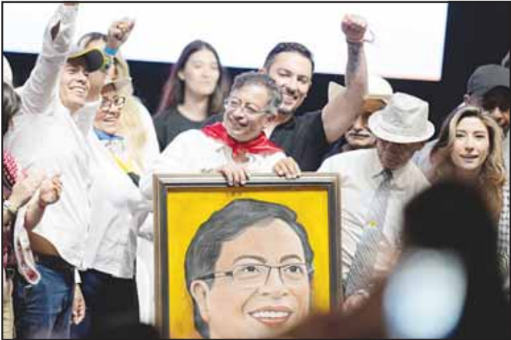
Colombian President Gustavo Petro holds up a portrait given to him by a supporter during a rally in Ibague, Colombia on Oct 3.

Petro has angered senior US officials by denying American extradition requests as well as criticizing the Trump administration’s immigration crackdown and its efforts to combat drug trafficking in neighboring Ven-