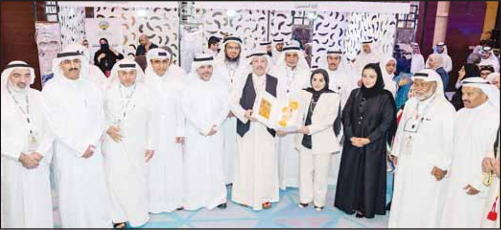
Minister of Social Affairs, Family and Childhood Affairs Dr. Amthal Al-Huwailah and Undersecretary of the Ministry Khalid Al-Ajmi during the celebration of the International Day of Older Persons.

The minister said the ministry continues to implement the national strategy to enhance the quality of life for the elderly, in line with New Kuwait 2035 vision, while complementing the Arab Strategy for the Elderly and reinforcing the shared visions of the GCC countries.