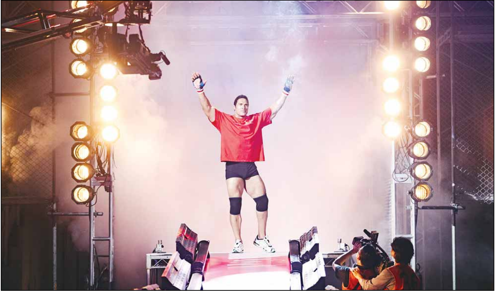
This image released by A24 shows Dwayne Johnson in a scene from ‘The Smashing Machine.’ (AP)