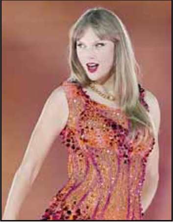
Taylor Swift performs at the Paris Le Defense Arena during her Eras Tour concert in Paris, on May 9, 2024.

its promise of up-tempo pop “bangers,” to borrow her own vernacular. Fans need not wait up for the long-anticipated “Reputation (Taylor’s Version),” because “The Life of a Showgirl” pulls from its essence. But this time, with a lot of affection, like a truer “Lover” era. Swift has long internalized criticisms and responded to them in her art, most directly in 2017’s “Reputation.” Here, she is once again concerned with her perception, articulated over booming, lush production on “Cancelled!” or “Elizabeth Taylor.” On the latter, she sings, “Hollywood hates me/ You’re only as hot as your last hit, baby.” Except this time, her love acts as an anchor. “I can’t have fun if I can’t have you,” she flirts. For “The Life of a Showgirl,” Swift enlisted Swedish producers Max Martin and Shellback, the hitmaking duo she collaborated with on 2012’s “Red,” 2014’s “1989” and, of course, “Reputation.” Notably absent is her frequent producing partner Jack Antonoff. It’s a wise decision: In years past, Swift, Shellback and Martin’s pop experiments shifted not only her career trajectory but the genre itself.