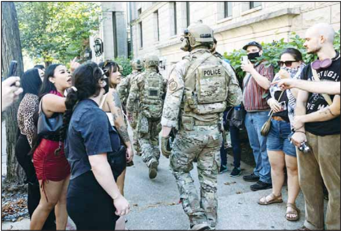
Pedestrians yell at federal agents from U.S. Immigration and Customs Enforcement and U.S. Customs and Border Protection as they walk along North Clark Street near West Oak Street in the River North neighborhood, Sunday, Sept. 28, 2025, in Chicago.