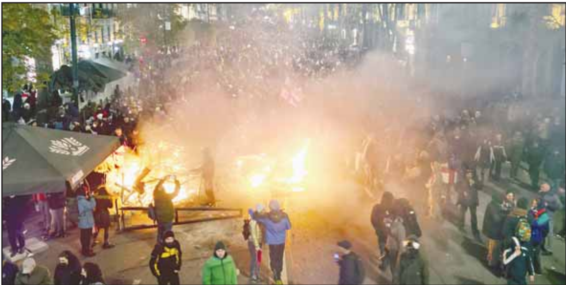
Protesters pour into the streets outside the parliament building in Tbilisi, Georgia, on Nov. 29, 2024.

news conference Friday. "There is no political bias associated with our enforcement." Meanwhile, a federal judge heard arguments - but did not immediately rule - on whether to temporarily block Trump's call-up of 200 Oregon National Guard members, which the administration said is needed to protect the ICE facility and other federal buildings. The escalation of federal law enforcement in Portland, population 636,000 and Oregon's largest city, follows similar crackdowns to combat crime in other cities, including Chicago, Baltimore and Memphis.