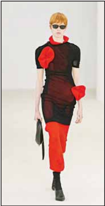
A model wears a creation by Issey Miyake in Paris show.

tiles as active matter. The caveat is familiar. Concept occasionally edged toward prop theater - the boxes, the stuffed netting - and risks overshadowing everyday use. Commercial clarity can blur when silhouettes impose rather than accommodate. Even so, this was among the label’s more fashion-forward recent