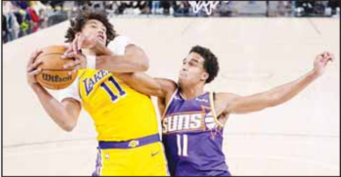
Los Angeles Lakers center Jaxson Hayes, left, grabs a rebound away from Phoenix Suns center Oso Ighodaro during the second half of an NBA preseason basketball game in Palm Desert, Calif.

and Dillon Brooks added 10 in his first game for Phoenix, which acquired the veteran agitator from Houston in the seven-team trade of Kevin Durant in July. The Lakers opened their preseason in the same Coachella Valley arena where Bronny James first played alongside his famous father in Los Angeles’ two preseason games here one year ago. With 40-year-old LeBron watching from courtside this time, Bronny was in the Lakers’ first substitution group, and he played nearly 23 minutes. Bronny, who turns 21 years old on Monday, didn’t make a shot in the first half and occasionally got beat on defense, but he hit five free throws and worked to run the Lakers’ offense. Reaves led the Lakers’ starters, which included newcomers Deandre Ayton and Jake LaRavia with Rui Hachimura and Jarred Vanderbilt. Ayton had eight rebounds and just one point while taking only two shots in 18 minutes. Grayson Allen added 13 points for Phoenix. The Lakers’ preseason continues Sunday against the Golden State Warriors in San Francisco.