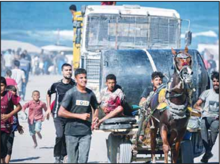
A Palestinian man injured by Israeli artillery fire targeting a group of civilians fleeing from northern Gaza to the south is evacuated on a horse-drawn cart, in central Gaza, Wednesday, Oct. 1.

by several countries describing it as a potential step towards an immediate ceasefire the release of all hostages the resumption of humanitarian aid and the reconstruction of hospitals and health services in the Strip. According to the report Estimating Trauma Rehabilitation Needs in Gaza, September 2025 Update, life-changing injuries account for one quarter of all reported cases, out of a total of 167,376 people injured since October 2023. More than 5,000 have undergone amputations, the WHO said. The findings, based on a wider data pool, remain consistent with the organization's earlier analyses. The report documents widespread severe injuries, including damage to limbs, spinal cord, brain, and major burns, creating a massive demand for specialized surgical and rehabilitation services. Many families face long-term struggles as patients require intensive care.