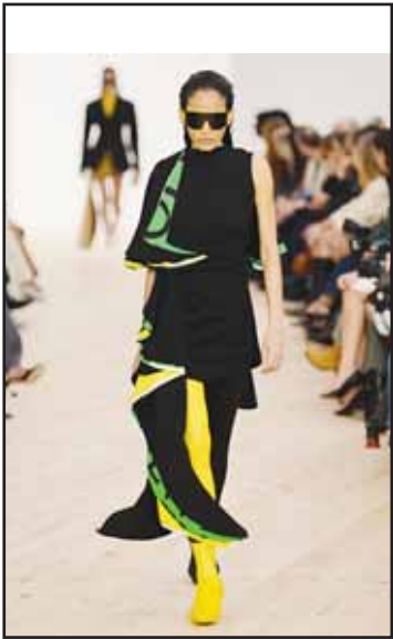
A model displays a creation by Loewe in Paris.