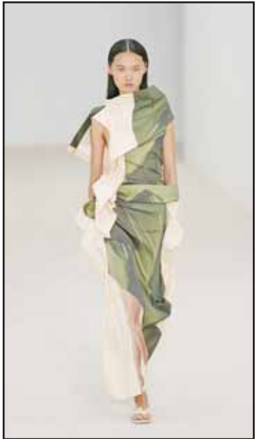
A model presents a creation by Issey Miyake in Paris.

tiles as active matter. The caveat is familiar. Concept occasionally edged toward prop theater - the boxes, the stuffed netting - and risks overshadowing everyday use. Commercial clarity can blur when silhouettes impose rather than accommodate. Even so, this was among the label’s more fashion-forward recent