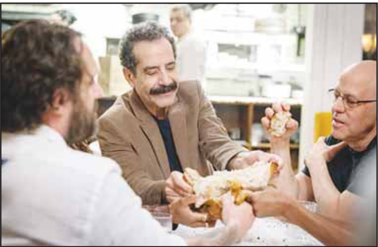
This image released by CNN shows Tony Shalhoub, center, in a scene from his series ‘Breaking Bread,’ which follows the actor across the globe as he explores cultures and food through the lens of bread.

Shalhoub is part of a crowded field of celeb travel hosts, which includes Rainn Wilson, Eugene Levy, Stanley Tucci, Orlando Bloom, Zac Efron, José Andrés, Chris Hemsworth, Will Smith, Eva Longoria and Ewan McGregor.