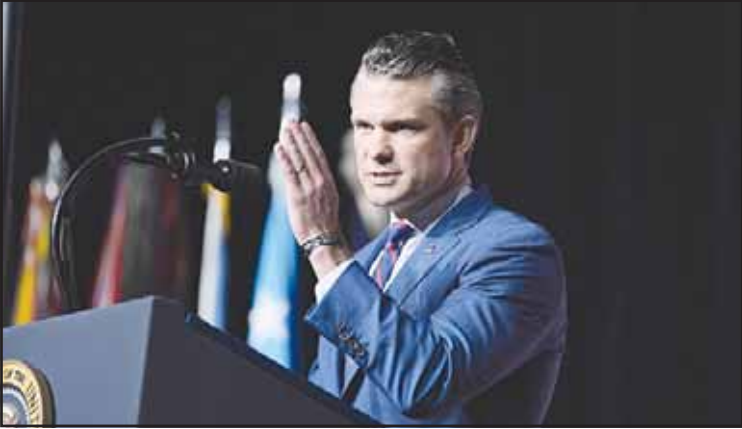
US Defense Secretary Pete Heggseth speaks to a gathering of top US military commanders at Marine Corps Base Quantico on Sept 30, in Quantico, Va.

On Friday, Venezuela complained to the United Nations regarding the US