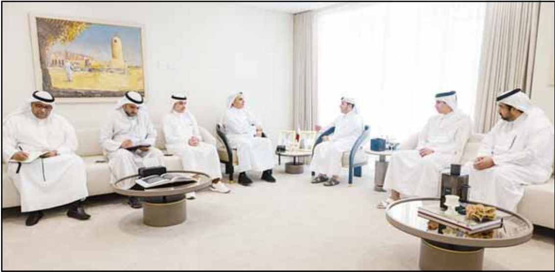
Photos during the visit of Assistant Foreign Minister for Saud N. Alsabah Kuwait Diplomatic Institute (KDI) Ambassador Nasser Alsabeeh to Qatar.