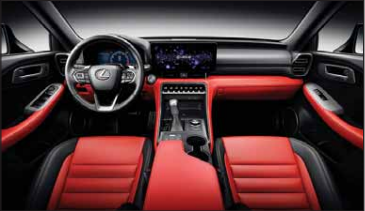
Lexus world premieres new IS sports sedan.

two variants: the IS 300h and IS 350. With “Refinement in performance and design” as the key development theme, the IS has been further polished to enhance the qualities it has long pursued, an “Engaging driving experience that allows dialogue with the car”