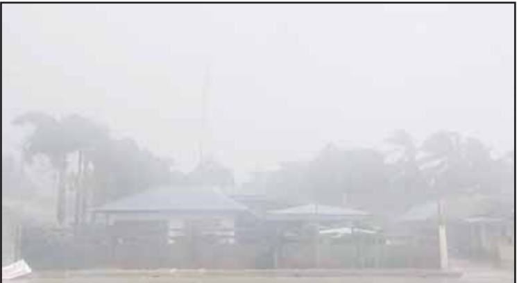
This grab from video shows buildings and trees being blown during storm in Dinapigue, Isabela province, Philippines on Oct 3.

China has a four-tier emergency response system, with Level I being the most severe response. Enditem