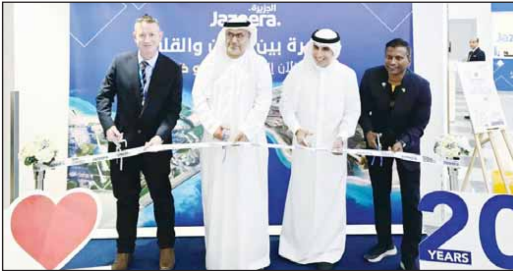
J9 - Abu Dhabi and Al Ain launch.

As part of the celebrations, the guests also visited Jazeera Airways' Hayakom Lounge which will be opening soon to cater to passengers at Jazeera Terminal 5 (T5).