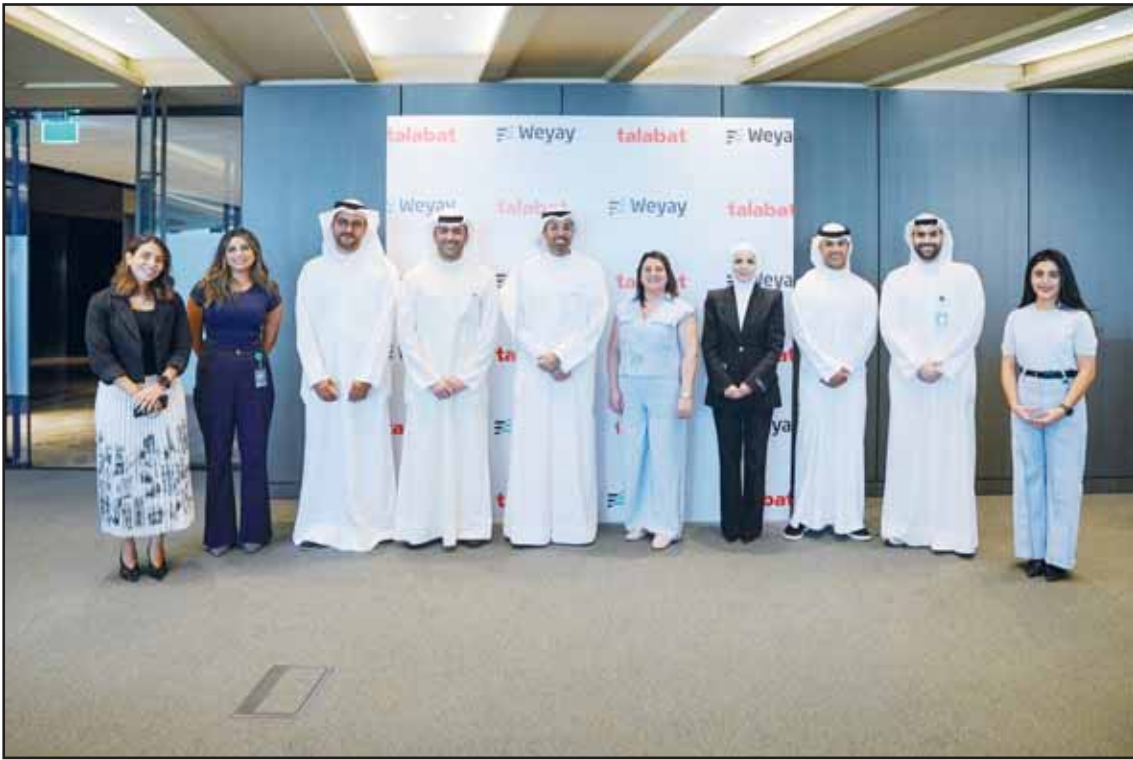
Weyay x talabat signing ceremony.

Student allowance customers can easily get a SELECT card through the Weyay app by simply transferring their student allowance to their Weyay Bank account within minutes via the Bank's app. This card allows them to benefit from a wide range of exclusive