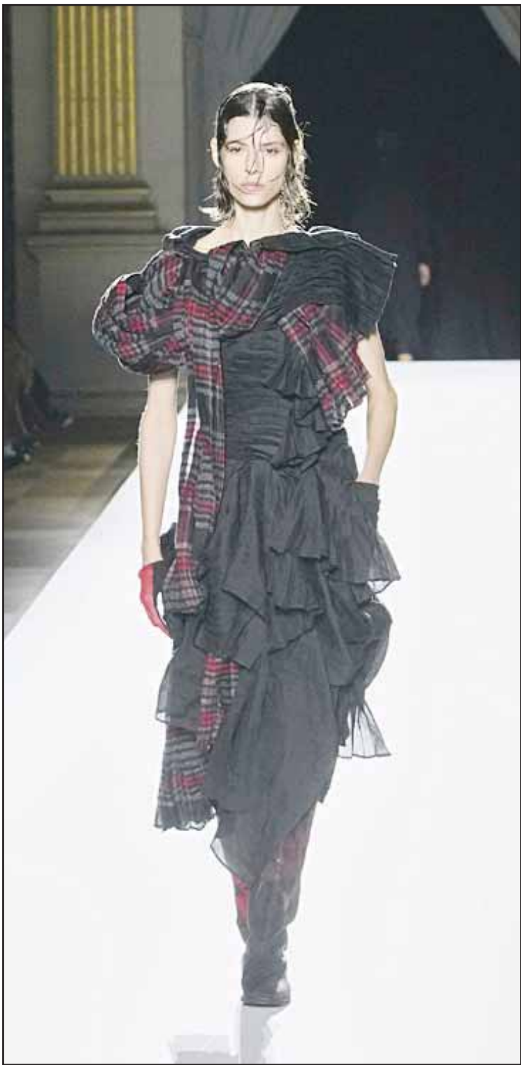
A model wears a creation as part of the Yamamoto Spring/Summer 2026 collection presented in Paris, Friday, Oct. 3.