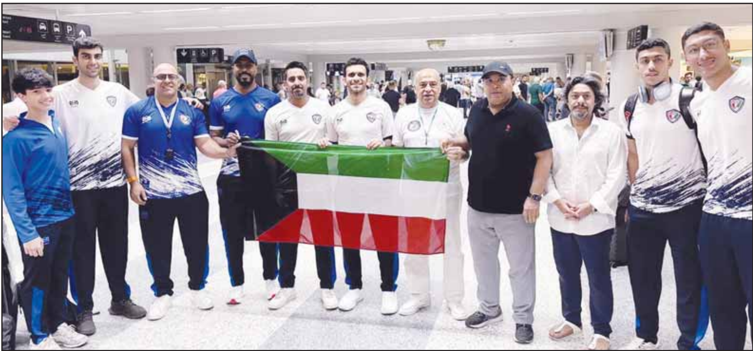
Kuwait squash delegation.