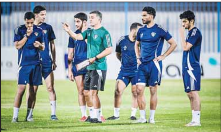
Players hold their final local training session.

By Khaled Al-Enezi Al-Seyassah/Arab Times Staff