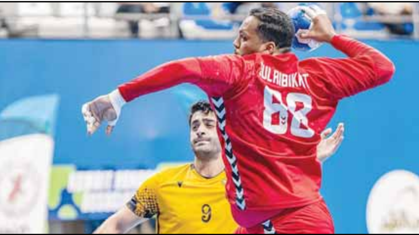
A Sulaibikhat player fires a shot at goal while an opponent tries to defend.

Sulaibikhat: 5 points Al-Nasr: 2 points The first round of the second section is scheduled for Tuesday and Wednesday. The Premier League is divided into three sections, with the team accumulating the most points claiming the 58th championship title in league history. In the fourth round of the First Division Handball League: Yarmouk defeated Al-Sahel 35-30 Al-Qurain overcame Al-Fahaheel 39-27 Khaitan beat the Youth National Team 34-32 Khaitan continues to lead the First Division with 8 points, followed by Yarmouk with 6 points, Al-Qurain with 4 points, Youth National Team with 3 points, Al-Fahaheel with 1 point, and Al-Sahel with 0 points.