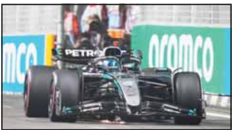
Mercedes driver George Russell of Britain in action during the qualifying for the Singapore Formula One Grand Prix at the Marina Bay Street Circuit in Singapore.