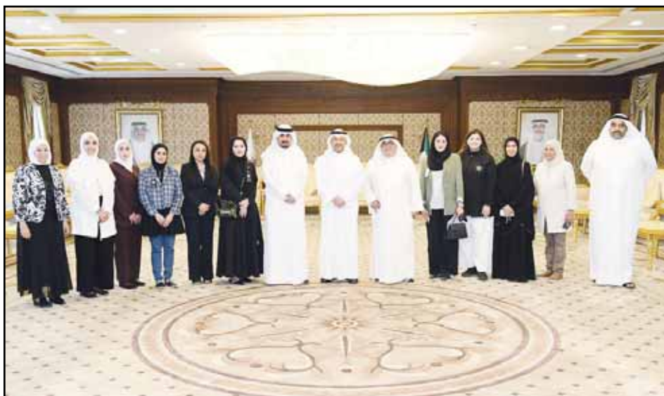
Farwaniya Governorate photo

The discussion also focused on ways to enhance cooperation and coordination among