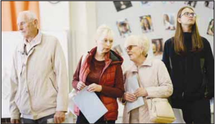
People wait in line at a polling station for a general election at a polling station in Brno, Czech Republic on Oct 3. (AP)

PRAGUE, Oct 4, (AP): Czechs cast ballots on Saturday in the second and final day of a parliamentary election that could put the country on a course away from supporting Ukraine and toward Hungary and Slovakia, which have taken a pro-Russian path. Billionaire Andrej Babiš is predicted to be the latest populist leader in Central Europe to stage an electoral comeback. Opinion polls favor Babis to beat a pro-Western coalition led by Prime Minister Petr Fiala that defeated him in the 2021 vote. With the victory, Babis would join the ranks of Prime Ministers Viktor Orbán of Hungary and Robert Fico of Slovakia, whose countries have refused to provide military aid to Ukraine, continue to import Russian oil and oppose European Union sanctions on Russia. The Czech Republic has been a staunch supporter of Ukraine since Russia's full-scale invasion in February 2022. The country has donated arms including heavy weapons to the Ukrainian armed forces and is behind