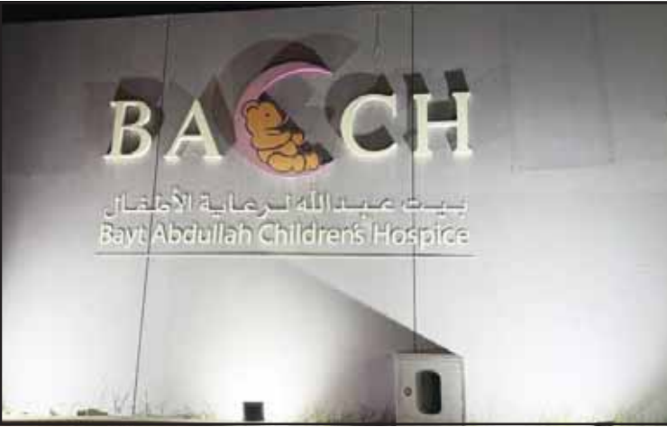
Bayt Abdullah Children's Hospice