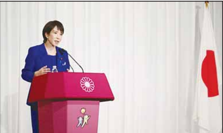
Sanae Takaichi, the newly-elected leader of Japan’s ruling party, the Liberal Democratic Party (LDP), attends a press conference after the LDP presidential election in Tokyo on Oct 4.

The LDP, whose consecutive losses in parliamentary elections in the past year have left it in the minority in both houses, needs its new leader to quickly bring