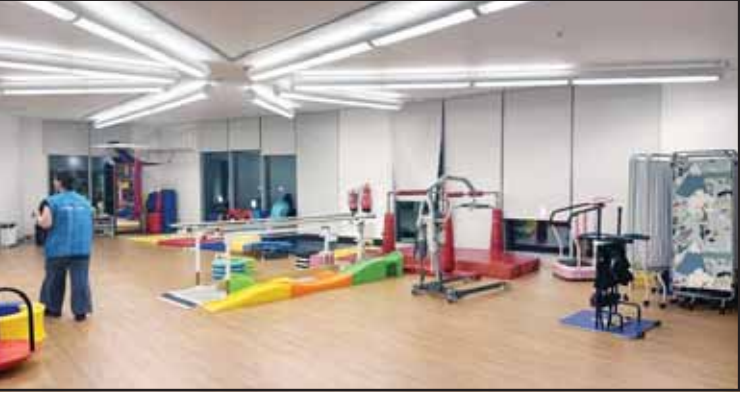
A play therapy room.