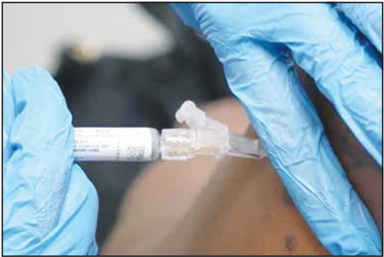
A pharmacist gives a patient a flu shot in Miami on Sept. 9, 2025.

90% hadn't been fully vaccinated. Another concern from last season: The CDC counted more than 100 children who developed a rare flu complication - brain inflammation that can lead to seizures, hallucinations, or even death. Very few were vaccinated. It's important for mothers-to-be to understand that a bad case of flu can put them in the hospital or cause their baby to be born prematurely, Riley said. Flu shot protection also carries over to newborns, and infants too young for their own vaccinations are especially vulnerable to flu. Riley stressed that years of flu vaccinations show that recommendation is safe for mother and baby. High-dose shots and those with a special immune booster are designed for people 65 and older, but if they can't find one easily they can choose a regular all-ages flu shot. For the shot-averse, the nasal spray