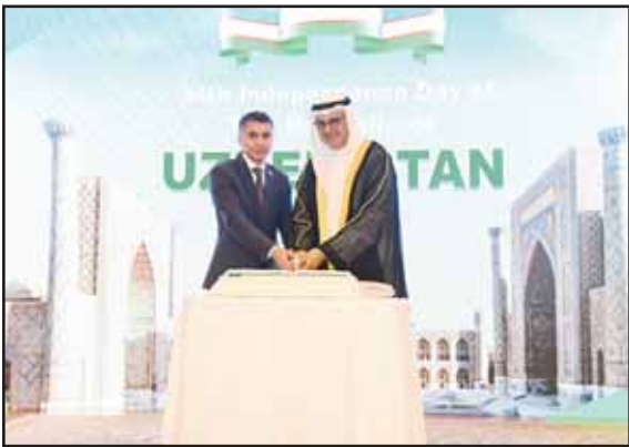
Ambassador of Uzbekistan to Kuwait Ayub Yunusov with acting Minister of State for Economic Affairs and Investment Dr. Subaih Al-Mukhaizeem during the ceremonial cake-cutting.