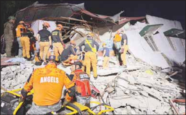
Rescuers search for survivors underneath rubble in Bogo, Philippines on Oct 1.

to a hospital from the mountain village. Deaths also were reported from the outlying towns of Medellin and San Remigio, where three coast guard personnel, a firefighter and a child were killed separately by collapsing walls and falling debris while trying to flee to safety from a basketball game in a sports complex that was disrupted by the quake, town of-