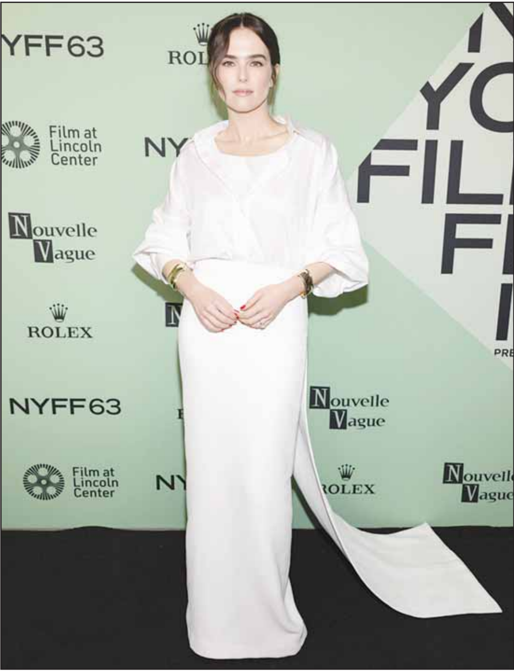
Zoey Deutch attends the premiere of 'Nouvelle Vague' at Alice Tully Hall during the 63rd New York Film Festival on Tuesday, Sept. 30, 2025, in New York.