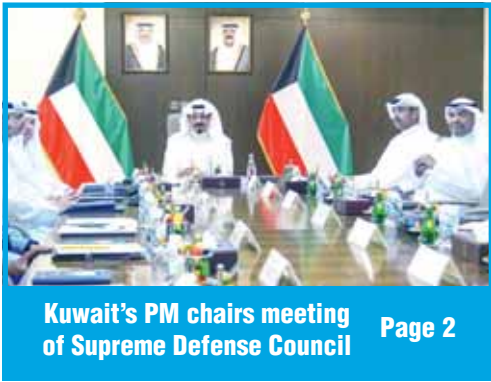
Kuwait's PM chairs meeting of Supreme Defense Council Page 2