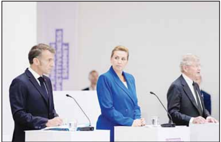
French President Emmanuel Macron, (from left), Denmark’s Prime Minister Mette Frederiksen and Chairman, Investor AB Jacob Wallenberg in Danish Industry’s building host the EU’s political leadership in Copenhagen, on Oct 1.

COPENHAGEN, Denmark, Oct 1, Europe is in the middle of a hybrid war waged by Russia and the continent must arm itself, Danish Prime Minister Mette Frederiksen warned on Wednesday as she hosted a summit of European Union leaders in Copenhagen. “I hope that everybody recognizes now that there is a hybrid war and one day it’s Poland, the other day it’s Denmark, and next week it will probably be somewhere else that we see sabotage or we see drones flying,” Frederiksen told reporters. Wednesday’s summit comes after a spate of troubling drone incidents at Danish airports and military bases over the last week. Ahead of the meeting, a special radar system was set up at Copenhagen airport to help keep watch. Unidentified drones forced the closure of the airfield a week ago, causing major disruptions. France, Germany, the Netherlands, Sweden and the U.K. also sent aircraft, ships and air defense systems to Denmark ahead of the talks. Ukraine’s armed forces have dispatched a mission to the Nordic country for joint exercises, sharing its expertise on combating Russian drones.