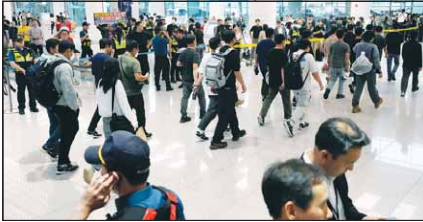
South Korean workers released after days of detention in Georgia, arrive at the Incheon International Airport, in Incheon, South Korea, on Sept. 12, 2025.

After bilateral visa talks Tuesday in Washington, South Korea’s Foreign Ministry said their American counterparts reaffirmed that South Korean companies can use B-1 short-term business visas or ESTAs to send workers to install, service and repair equipment needed for their projects in the United States. The statement was consistent with earlier remarks by South Korean Foreign Minister Cho Hyun, who, after traveling to Washington to negotiate the workers’ release, said that U.S. officials had agreed to allow them to return later to complete their work.