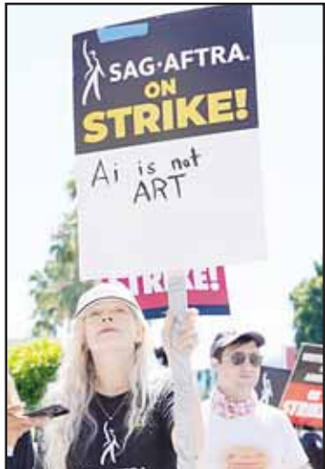
Actor Frances Fisher holds a sign that says 'AI is not art' at a rally by striking writers and actors outside Paramount studios in Los Angeles on July 14, 2023.