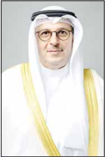
H.E. Dr. Sabeeh Abdulaziz Al-Mukhaizim, Minister of Finance

“This landmark issuance is a testament to the global market’s confidence in Kuwait’s fiscal strength, prudent policies, and enduring financial buffers. The scale of demand and competitive pricing achieved position Kuwait as a premier sovereign issuer. Beyond financing needs, this transaction reinforces Kuwait’s credibility in global