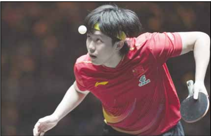
Wang Chuqin of China serves during the men's singles round of 32 match against Milosz Redzimski of Poland at 2025 World Table Tennis (WTT) China Smash in Beijing, China. (Xinhua)

BEIJING, Oct 1, (Xinhua): World No. 1 Wang Chuqin emerged victorious in a five-game battle against Poland's Milosz Redzimski to advance to the men's singles last 16 at the World Table Tennis (WTT) China Smash on Wednesday. Facing the 45th-ranked Redzimski in their first head-to-head, Wang took the first two games 11-7, 11-4. Seemingly headed for a comfortable win, the top seed fell into an 8-2 hole in the third game, rallied with seven straight points for a 9-8 edge, but lost 12-10. With two Table Tennis Review calls going against him, Wang dropped the fourth game 11-8 and trailed 4-2 in the decider. He then reeled off three points in a row to move ahead 8-5. Redzimski pulled back to 9-8, but amid loud home support Wang held firm to close out an 11-8 victory, avoiding another round-of-32 exit at the event after last year. Wang was joined in the last 16 by Liang Jingkun, who rallied past Lin Gaoyuan 3-1 in an all-Chinese clash. Liang led their head-to-head 9-3 before Wednesday's match. "We have played against each other for many years. It seems that every time the draw makes us together," Liang said after his win. Lin took the early initiative, breaking a 7-7 tie with three points in a row to take the opening game 11-8. Liang then turned the match around with powerful attacks, winning 13-11, 11-9, 11-5 to seal victory. Instead of focusing on his own performance, Liang asked the crowd to applaud Lin. "He has worked so hard for Team China in many years," Liang commented.