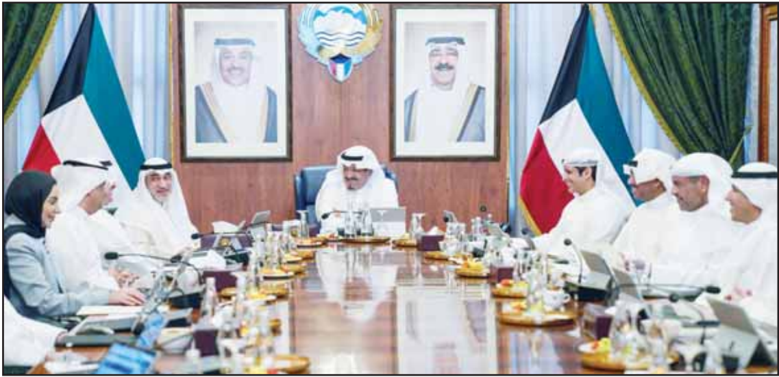
Prime Minister Diwan photo His Highness the Prime Minister Sheikh Ahmad Abdullah Al-Ahmad Al-Sabah chaired the Cabinet meeting at Bayan Palace.

His highness deplored in the strongest terms the brutal Israeli occupation attack on the sisterly State of Qatar, stressing the GCC see this assault as a flagrant violation of all international