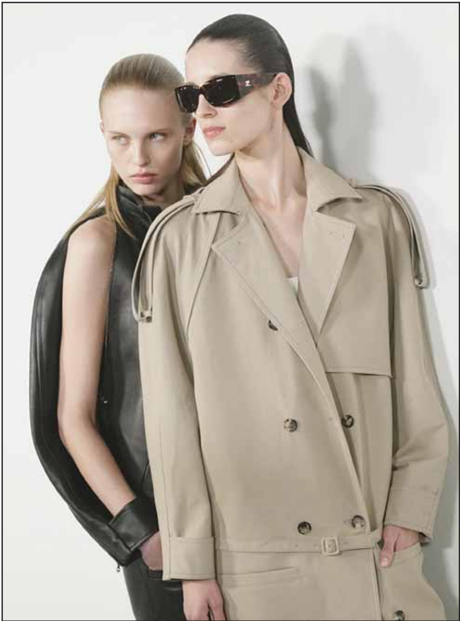
A model presents a creation by Stella McCartney in Paris, Sept 30.