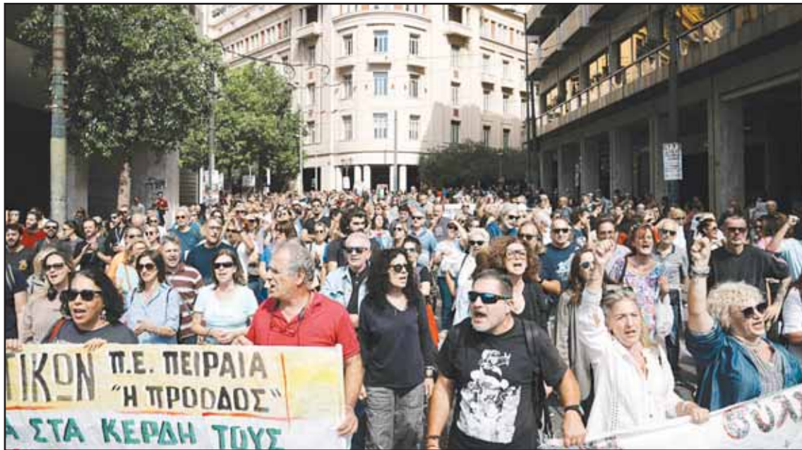
Protesters take part in a nationwide 24-hour strike in Athens, Greece on Oct 1, as labor unions demand higher wages and the withdrawal of a bill changing work hours.

cludes a $500 million payment from Harvard that would be used to create “a giant trade school, a series of trade schools that would be run by Harvard.” Trump described it as an investment to revive trade schools and produce workers for American plants. “They’re going to be teaching people how to do AI and lots of other things,” Trump said. Harvard and the White House did not immediately respond to requests for comment. A deal would open the door to a resolution of sanctions that have included cuts to more than $2.6 billion in Harvard’s research grants, losses of federal contracts, and efforts to cut off the school’s ability to enroll foreign students. Trump’s administration has accused Harvard of tolerating antisemitism, particularly during last year’s protests over the Israel-Hamas war. In a letter to Harvard, federal officials said the campus was “overrun by an impermissible, multiweek encampment” that left Jewish and Israeli students fearful and disrupted their studies. Harvard President Alan Garber has acknowledged problems with antisemitism and anti-Muslim bias on campus, but said Harvard has taken strides to fight prejudice.