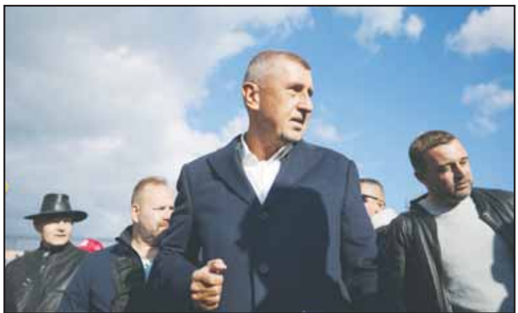
Chairman of opposition ‘ANO’ (YES) movement Andrej Babis talks to his supporters during a rally ahead of Parliamentary elections in Prague, Czech Republic on Sept. 30.

PRAGUE, Oct 1, A parliamentary election in the Czech Republic on Friday and Saturday could deprive Ukraine of a staunch supporter and put the Czechs on a course away from the European mainstream, following the pro-Russian path taken by Hungary and Slovakia. Billionaire Andrej Babiš is predicted to be the latest populist leader in Central Europe to stage an electoral comeback, as opinion polls put him on course for victory over a pro-Western coalition that defeated him four years ago. If he wins, he would join the ranks of Viktor Orbán of Hungary and Robert Fico of Slovakia, whose countries have refused to provide military aid to Ukraine, continue to import Russian oil and oppose sanctions on Russia. Amid Russia’s full-scale invasion of Ukraine, Prime Minister Petr Fiala and his coalition of three conservative parties called Together have made the threat from Moscow the key to their campaign. “Vote for freedom! Vote for security!” they urged the electorate. The opposition led by Babiš blamed Fiala for all the troubles of recent years, from the energy crisis to soaring inflation, and pledged to revoke his