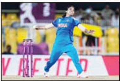
India's Amanjot Kaur bowls a delivery during the ICC Women's Cricket World Cup match between India and Sri Lanka at Barsapara Cricket Stadium in Guwahati. India won by 59 runs. – See Page 15