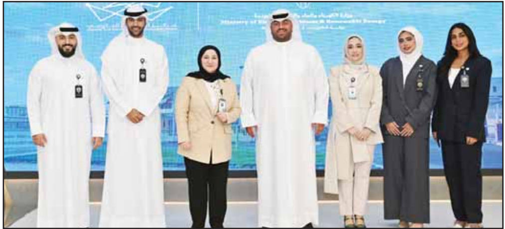
Group photo during the event.

experienced by the Rohingya Muslims constitute "a complete crime against humanity."