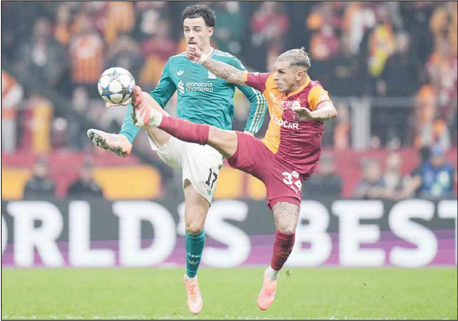
Galatasaray's Lucas Torreira, right, and Liverpool's Curtis Jones battle for the ball during the Champions League opening phase soccer match between Galatasaray and Liverpool at the Ali Sami Yen stadium, in Istanbul, Turkey.

Marseille beat visiting Ajax 4-0, and Lautaro Martínez scored twice to lead Inter Milan to a 3-0 win at