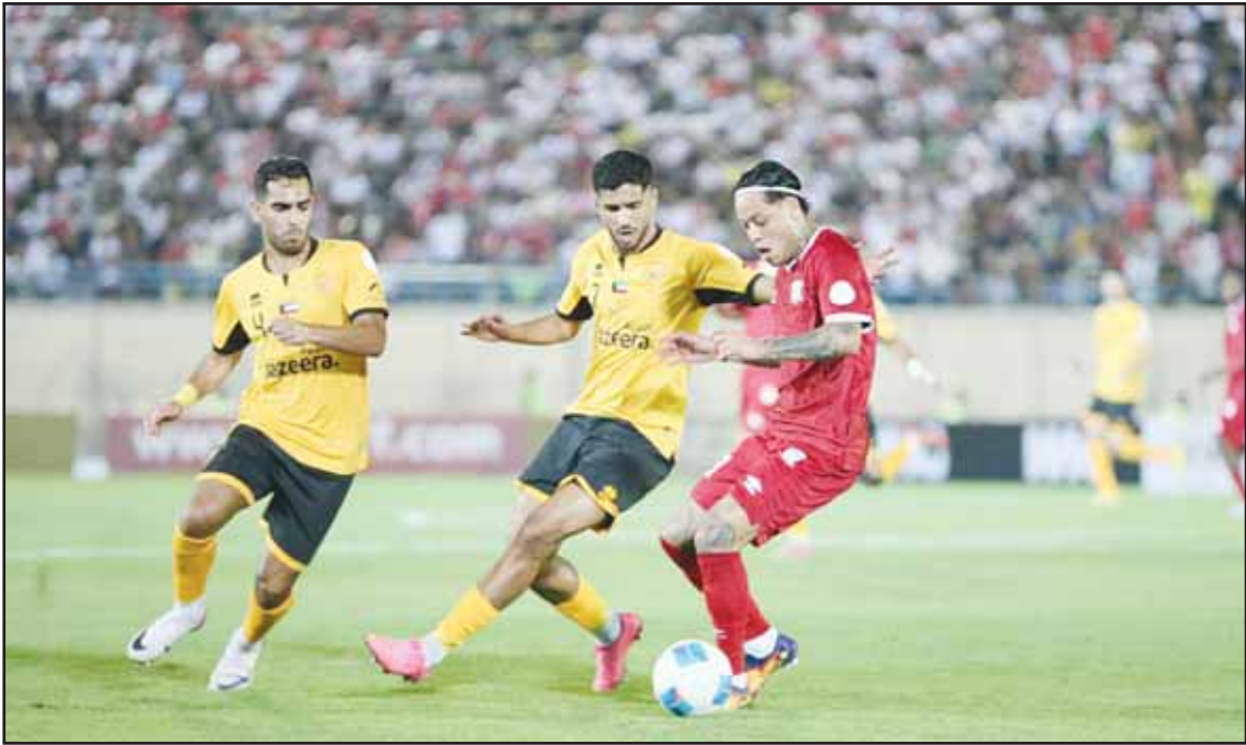
Players challenging for the ball.