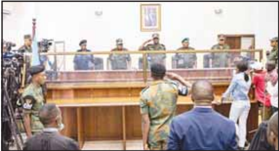
Military officers stand in the dock during the trial of former Congolese president Joseph Kabila in Kinshasa, Democratic Republic of Congo on Sept 30. (AP)

Malema found guilty on gun charges: South African opposition leader Julius Malema was found guilty Wednesday of breaking firearm laws in a 2018 incident where he was filmed firing a rifle at a political rally. The fiery politician, who leads the opposition party Economic Freedom Fighters, was charged with contravening the Firearms Control Act. (AP)