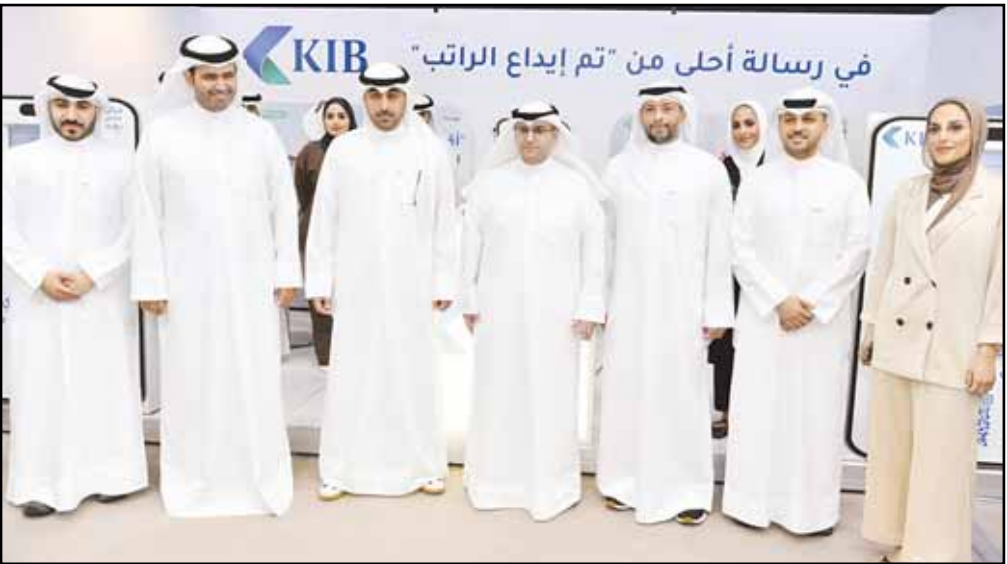
KIB ‘Baiti’ Expo 2025

the role of the banking sector in strengthening public-private partnerships and accelerating the adoption of sustainable financing solutions that contribute to enhancing quality of life.