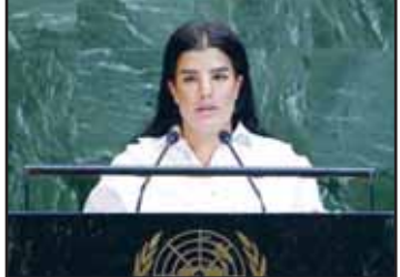
Second Mission Secretary of the Permanent Delegation of Kuwait to the United Nations, Wafa Al-Mulla, at the UN General Assembly.

Al-Mulla said that the ethnic cleansing, systematic mass displacement, and deprivation of basic human rights