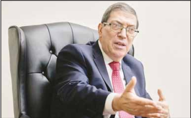
Cuba’s Foreign Minister Bruno Rodríguez Parrilla speaks during an interview with The Associated Press at the Permanent Mission of Cuba to the United Nations, in New York on Sept 30. (AP)

NEW YORK, Oct 1, (AP): Recent US escalations in the Caribbean are a result of Secretary of State Marco Rubio’s “personal” agenda against the region, Cuba’s top diplomat said, adding that his American counterpart is increasingly pushing policies that do not align with President Donald Trump’s so-called mandate for peace. Foreign Minister Bruno Rodríguez Parrilla told The Associated Press that Cuba saw a possibility of changing the longstanding antagonistic dynamic between the United States and the communist-run island when Trump returned to office in January. But he added that Rubio, who was born to Cuban immigrants, has made it his mission for Washington to adopt an even stronger “maximum pressure” campaign against Havana. “The current secretary of state was not born in Cuba, has never been to Cuba, and knows nothing about Cuba,” Rodríguez said in a sit-down interview with The Associated Press on Tuesday. “But there is a very personal and corrupt agenda that he is carrying out, which seems to be sacrificing the national interests of the U.S. in order to