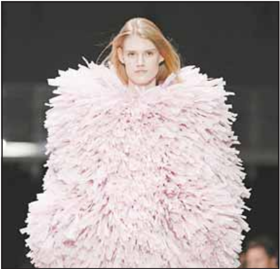
A model presents a creation by Stella McCartney in Paris, Sept 30.