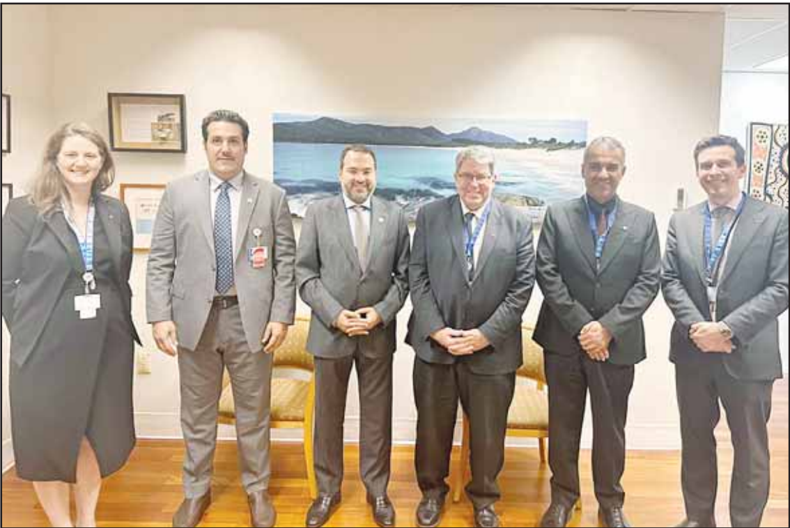
Kuwait's Public Authority for Civil Aviation delegation with Australian delegation.