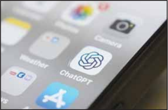
ChatGPT app icon is seen on a smartphone screen, Aug. 4, 2025, in Chicago. (AP)

NEW YORK, Oct 1, (AP): If the future of the internet looks like a constant stream of amusing videos generated by artificial intelligence, then OpenAI just placed its stake in an emerging market. The company behind ChatGPT released its new Sora social media app on Tuesday, an attempt to draw the attention of eyeballs currently staring at short-form videos on TikTok, YouTube or Meta-owned Instagram and Facebook. The new iPhone app taps into the appeal of being able to make a video of yourself doing just about anything that can be imagined, in styles ranging from anime to highly realistic. But a scrolling flood of such videos taking over social media has some worried about “AI slop” that crowds out more authentic human creativity and degrades the information ecosystem. “These things are so compelling,” said Jose Marichal, a professor of political science at California Lutheran University who studies how AI is restructuring society. “I think what sucks you in is that they’re kind of implausible, but they’re realistic looking.” The Sora app’s official launch video features an AI-generated version of OpenAI CEO Sam Altman speaking from a psychedelic forest, and later, the moon and a stadium crowded with cheering fans watching rubber duck races. He introduces the new tool before handing it off to