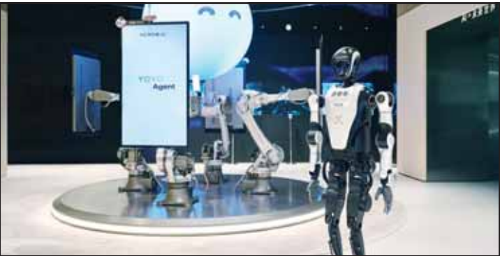
ALPHA PLAN becomes reality with new flagship store.

SHENZHEN, Oct 1: Global AI device ecosystem brand HONOR has officially inaugurated its ALPHA Global Flagship Store at Shenzhen Bay MixC, positioning the space as an “AI Smart Living Innovation Hub” – a destination where cutting-edge technology converges with cultural inspiration.