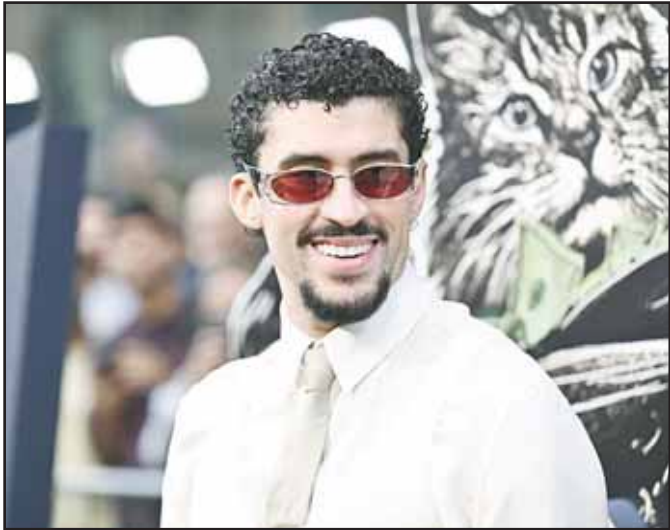
Benito Antonio Martínez Ocasio (aka Bad Bunny) attends the premiere of 'Caught Stealing' at Regal Union Square on Tuesday, Aug. 26, 2025, in New York.

The question is - what messages will Bad Bunny deliver in a culture where identity is politicized? And what does it mean that his performance arrives in the midst of one of the largest immigration crackdowns in US history, where Latinos are especially vulnerable?