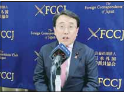
Japan’s top negotiator on President Donald Trump’s tariffs, Economic and Fiscal Policy Minister Ryosei Akazawa speaks to reporters at the Foreign Correspondents’ Club of Japan, in Tokyo Wednesday, Oct. 1, 2025.

The double-digit tariffs Trump has imposed on imports from various nations were