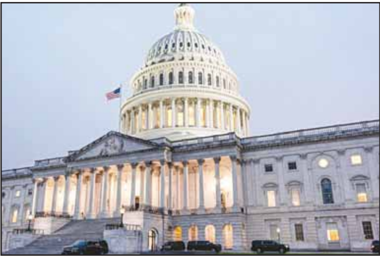
The Capitol is seen at dusk as Democrats and Republicans in Congress are angrily blaming each other and refusing to budge from their positions on funding the government, in Washington on Sept 30.

the first since his return to the White House this year, in a remarkable record that underscores the polarizing divide over budget priorities and a political climate that rewards hard-line positions rather than more traditional compromises. The Democrats picked this fight, which was unusual for the party that prefers to keep government running, but their voters are eager to challenge the president’s second-term agenda. Democrats are demanding funding for health care subsidies that are expiring for millions of people under the Affordable Care Act, spiking the costs of insurance premiums nationwide. Republicans have refused to negotiate for now and have encouraged Trump to steer clear of any talks. After the White House meeting, the president posted a cartoonish fake video mocking the Democratic leadership that was widely viewed as unserious and racist. What neither side has devised is an easy offramp to prevent what could become a protracted closure. The ramifications are certain to spread beyond the political arena, upending the lives