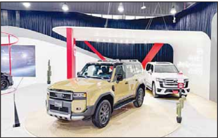
Photos during the event.

covering 700 sq meters to feature 12 most reliable cars with a strategic focus to promote Toyota's motorsport brand inspired Gazoo Racing (GR) cars, as well as their environment-friendly cars powered by hybrid electric technology.