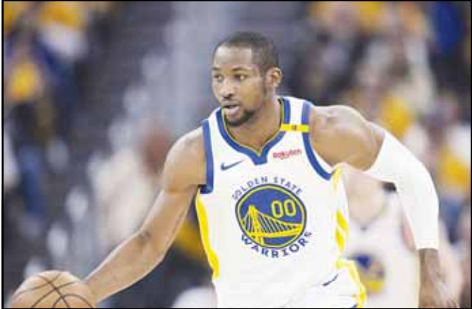
In this file photo, Golden State Warriors forward Jonathan Kuminga dribbles against the Minnesota Timberwolves during Game 3 of an NBA basketball second-round playoff series in San Francisco.