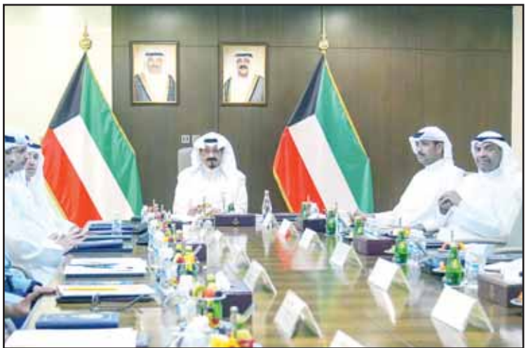
His Highness the Prime Minister chairs a meeting of the Supreme Defence Council.

sible fields. His Highness the Crown Prince expressed his gratitude for the UK Prime Minister's gesture, which reflected the deep-rooted relations linking the two countries, wishing the UK further progress and development.