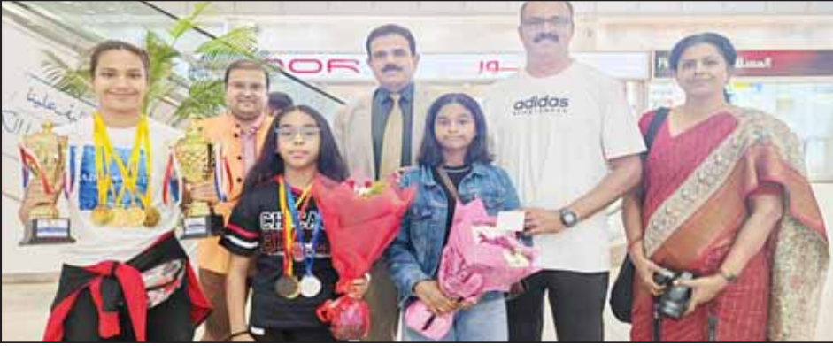
Photos during the competition.