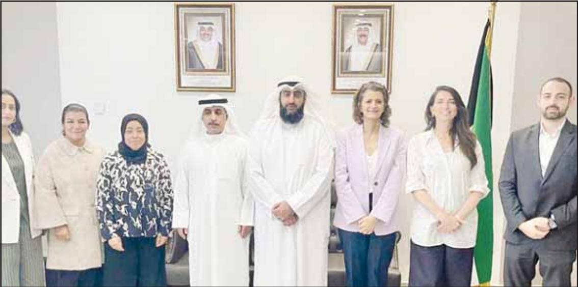
Group photo during the official reception of the UNICEF delegation by Kuwait Ministry of Health officials.

By Marwa Al-Bahrawi Al-Seyassah/Arab Times Staff