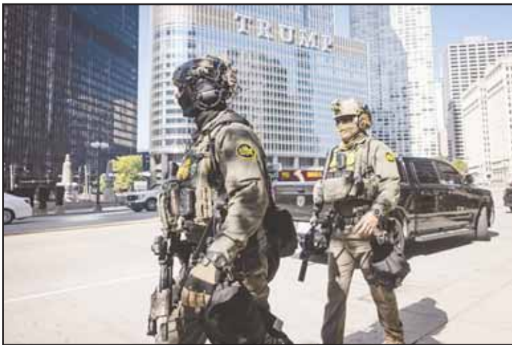
Federal agents from US Immigration and Customs Enforcement and U.S. Customs and Border Protection walk along West Wacker Drive in the Loop on Sept 28, in Chicago. (AP)

CHICAGO, Oct 1, (AP): The sight of armed, camouflaged and masked Border Patrol agents making arrests near famous downtown Chicago landmarks has amplified concerns about the Trump administration’s growing federal intervention across US cities. As Illinois leaders warned Monday of a National Guard deployment, residents in the nation’s third-largest city met a brazen weekend escalation of immigration enforcement tactics with anger, fear and fresh claims of discrimination. “It looks un-American,” said Chicago Alderman Brendan Reilly, who represents downtown on the City Council. He deemed the Sunday display a “photo op” for President Donald Trump, echoing other leaders. Memphis, Tennessee, and Portland, Oregon, also braced for a federal law enforcement surge. Meanwhile, Louisiana’s governor asked for a National Guard deployment to New Orleans and other cities. Trump has called the expansion of federal immigration agents and National Guard troops into American cities necessary, blasting Democrats for crime and lax immigration policies. Following a crime crackdown in the District of Columbia and immigration enforcement in Los Angeles, he’s referred to Portland as “war-ravaged” and threatened apocalyp-