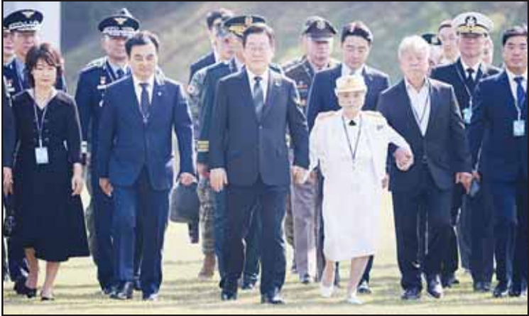
South Korean President Lee Jae Myung, (center left), arrives for a celebration to mark 77th Armed Forces Day in Gyeryong, South Korea on Oct 1.

SEOUL, South Korea, Oct 1, South Korea’s president vowed Wednesday to sharply increase defense spending and build a more self-reliant military, as US President Donald Trump’s “America First” agenda raises questions about the US security commitment to its Asian ally. A tariff war instigated by Trump’s administration and his transactional approach to security threaten to erode many South Koreans’ trust in the US. There are concerns that he may demand much higher South Korean payments for the US military presence in the country or possibly downsize America’s military footprint to focus more on China. In an Armed Forces Day ceremony Wednesday, South Korean President Lee Jae Myung described the South Korea-US military alliance as “solid” and didn’t mention any concerns about Trump’s policies. But he repeatedly stressed an intention to build a strong military that can independently defend the country from external threats. To boost a self-reliant defense posture, Lee said his government would increase next year’s defense spending by 8.2% to introduce advanced weapons systems like AI combat robots, au