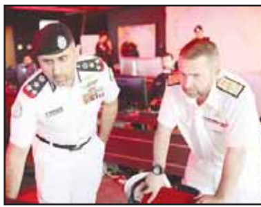
Kuwait Coast Guard Chief with UK's Senior Defense Adviser for Middle East Affairs.