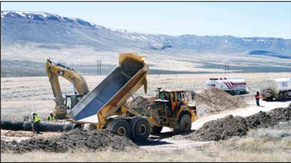
Construction continues at the Lithium Nevada Corp. mine site Thacker Pass project, April 24, 2023, near Orovada, Nev.

The government is getting a 10% stake in Intel through the conversion of billions in previously granted government funds and pledges. The administration spent $400 million of taxpayer money in July on MP Materials stock to make the U.S. government the biggest owner in the Las Vegas rare earths miner. Trump also made a deal with Nvidia and AMD to give the