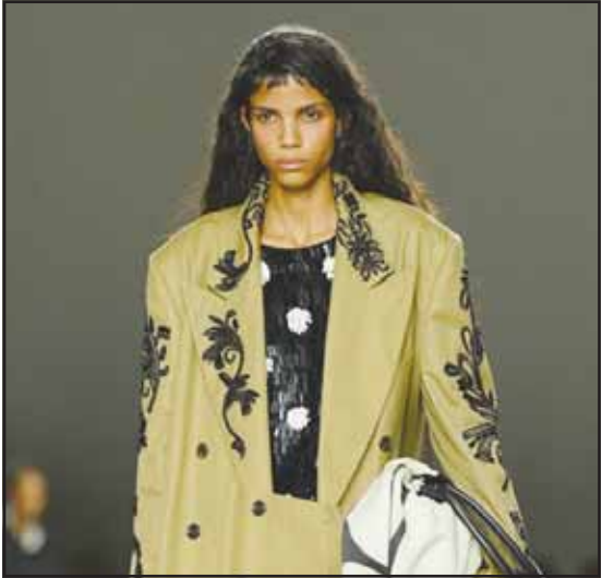
A model wears a creation as part of the Dries Van Noten SS26 collection in Paris.