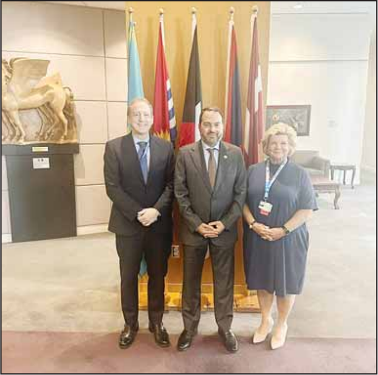
Part of the meeting with representatives of the Airports Council International (ACI).