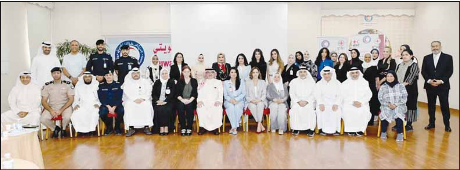
Workshop participants including representatives from the Kuwaiti Ministries of Interior and Foreign Affairs pose for a group photo.

side Kuwait, along with specialized courses and workshops to train personnel and volunteers, Al-Mazrouei noted. Broad institutional participation