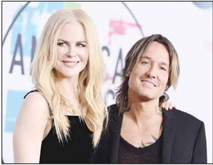
Nicole Kidman, (left), and Keith Urban arrive at the American Music Awards on Nov. 19, 2017, in Los Angeles.

"The mother and father will behave with each other and each child so as to provide a loving, stable, consistent and nurturing relationship with the child