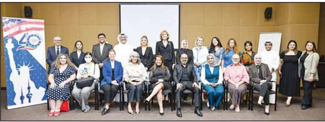
Photo during the workshop.