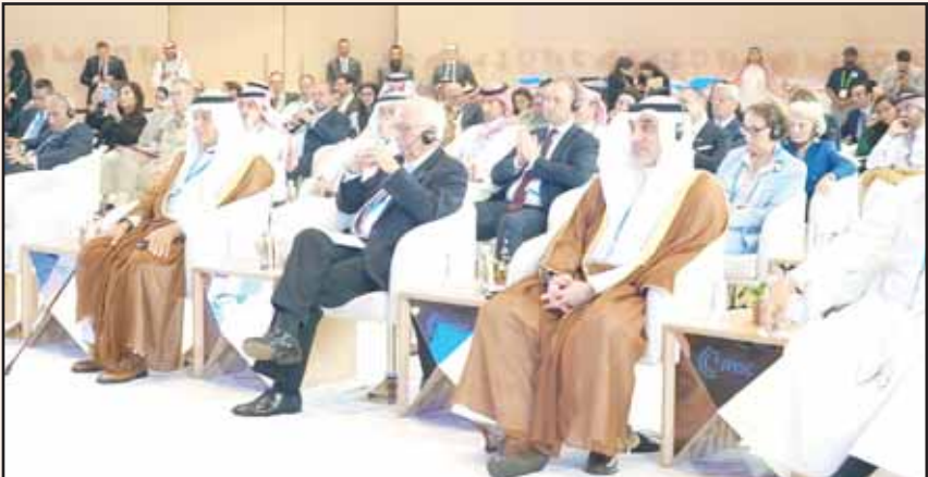
Representative of His Highness the Prime Minister during his participation at the Munich Security Conference in AIUla.

He noted that the meeting provided a vital platform to discuss pressing global and regional security challenges, particularly the escalating conflicts and humanitarian trag-