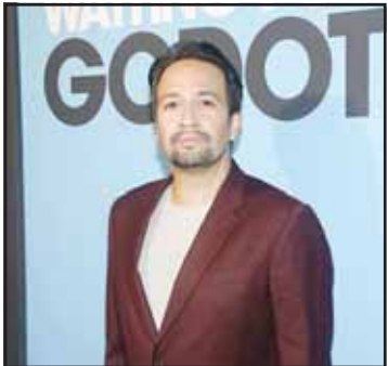
Actor Lin-Manuel Miranda attends ‘Waiting for Godot’ Broadway opening night at the Hudson Theatre on Sept. 28, 2025, in New York.