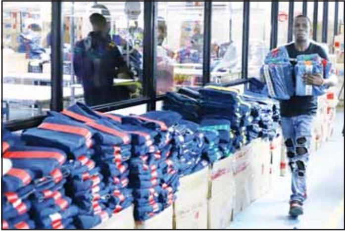
A factory worker arranges garments at United Aryan EPZ Limited in Ruaraka on the outskirts of Nairobi, Kenya, March 21, 2025.

“I will be asking (Trump) for the U.S. to consider seriously renewing and extending AGOA for at least a minimum of five years,” Kenyan President William Ruto said last week at the U.N. General Assembly. “It is a platform that connects Africa and the U.S. in a