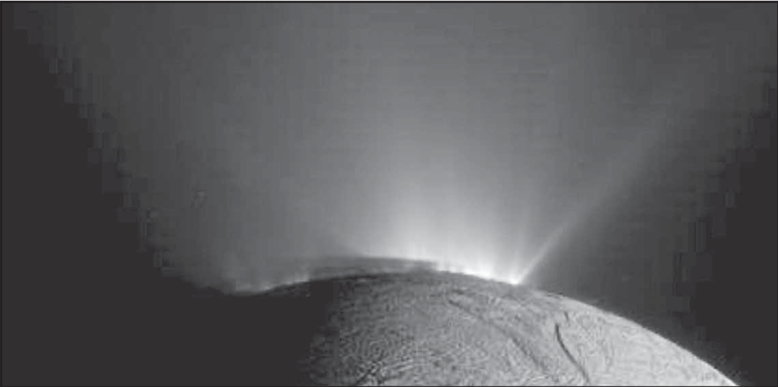
In this image provided by NASA, NASA's Cassini spacecraft captured this image of Enceladus on Nov. 30, 2010, with the shadow of the body of Enceladus on the lower portions of the jets is clearly visible.