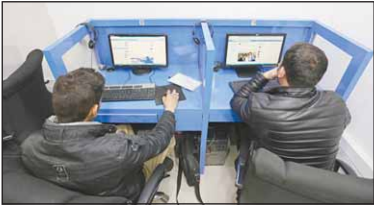
In this Feb 10, 2016 photo, Afghans access social media websites at a private internet cafe in Kabul, Afghanistan.

ISLAMABAD, Oct 1, (Agencies): The Afghan government’s spokesman Zabihullah Mujahid on Wednesday said that the country’s internet disruption was due to technical reasons, and denied reports about an internet ban in Afghanistan. “The old internet fiber across Afghanistan has worn out and is being replaced,” the official Urdu X account of the Afghan government quoted Mujahid as saying. Afghanistan has witnessed network disruptions in recent days, leading to speculation on social media about possible restrictions on internet use. Several provinces last month confirmed an internet shutdown because of a decree from the Taliban leader Hibatullah Akhundzada to combat immorality. The statement did not say when or if services would be restored. The outage was first reported Monday by internet advocacy group NetBlocks, which said internet connectivity was collapsing across the country, including in the capital Kabul, and telephone services also were impacted. Afghan carrier Kam Air told local TV channel TOLO News it would likely resume flights to Kabul later Wednesday, after fully halting operations since Monday due to the outage. Also: KABUL: Afghan counter-narcotics police have raided and destroyed two