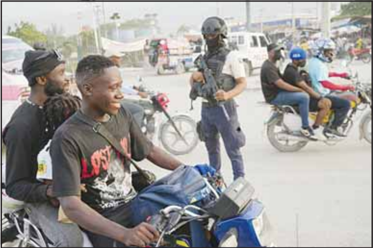
Police officers patrol an intersection in Port-au-Prince, Haiti on Sept 30. (AP)

UNITED NATIONS, Oct 1, (AP): The UN Security Council voted Tuesday to authorize a much larger, 5,550-member international force with expanded powers to help stop escalating gang violence in Haiti. The resolution, co-sponsored by the United States and Panama, will transform the current Kenya-led multinational force into a “Gang Suppression Force” with the power to arrest suspected gang members, which the current force does not have. The vote was 12-0 with Russia, China and Pakistan abstaining. US Ambassador Mike Waltz said the resolution’s adoption “offers Haiti hope.” “It is a hope that has been rapidly slipping away as terrorist gangs expanded their territory, raped, pillaged, murdered and terrorized the Haitian population ... (and) jeopardized the very existence of the Haitian state,” he said. Gangs have grown in power since the assassination of President Jovenel Moïse in 2021. They now control 90% of the capital, Port-au-Prince, and have expanded their activities, including looting, kidnapping, sexual assaults and rape, into the countryside. Haiti has not had a president since the assassination. The US Embassy in Port-au-Prince said the message from the Security