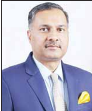
Dr. Adarsh Swaika India's Ambassador to Kuwait

As Ambassador Adarsh Swaika concludes his tenure in Kuwait, it is fitting to reflect on his remarkable contributions to strengthening the bonds between our two nations. His time in Kuwait has been defined by vision, commitment, and an unyielding dedication to advancing India-Kuwait relations at both the governmental and people-to-people level. One of the most historic milestones under his leadership was the visit of Prime Minister Narendra Modi to Kuwait, the first visit by an Indian Prime Minister in 43 years. This momentous occasion not only renewed high-level dialogue but also resulted in the elevation of our bilateral relations to the level of a Strategic Partnership. During the visit, His Highness the Amir conferred upon Prime Minister Modi the Mubarak Al Kabere Order, Kuwait’s highest national honour, a rare distinction reserved for select Heads of State and Government.