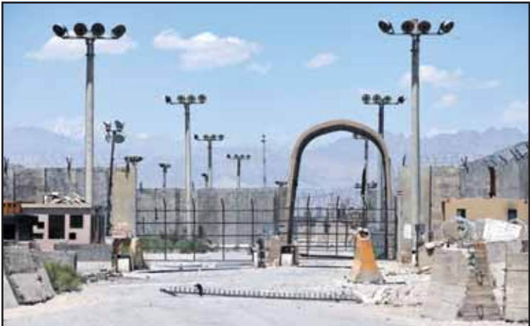
A gate is seen at the Bagram Air Base in Afghanistan on June 25, 2021.