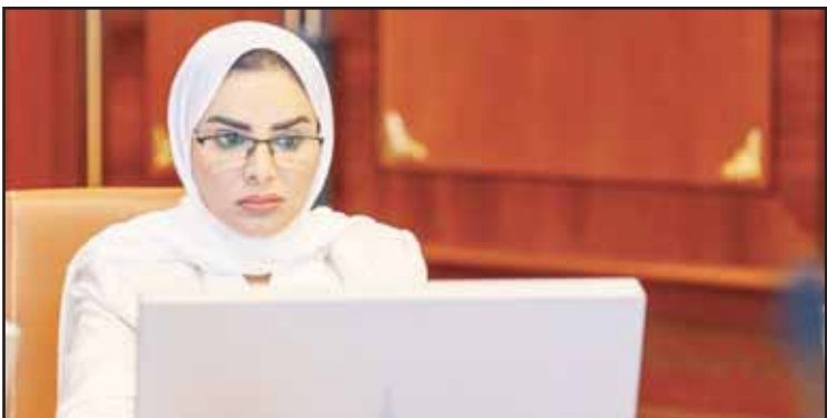
Minister of Social Affairs, Family and Childhood Affairs Dr. Amthal Al-Huwailah