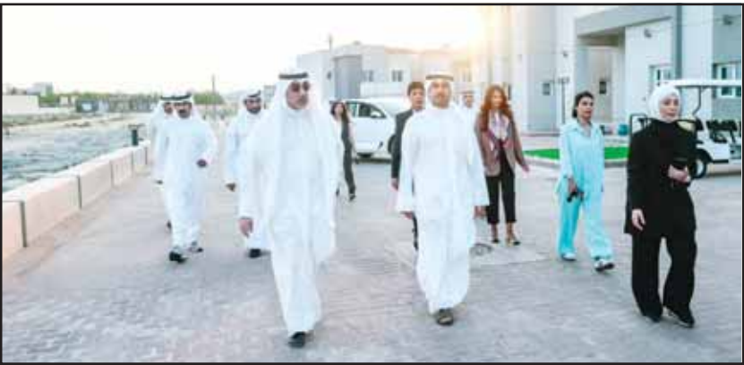
First Deputy Prime Minister and Minister of Interior Sheikh Fahad Al-Yousef conducts an inspection visit to the Police Officers Club.