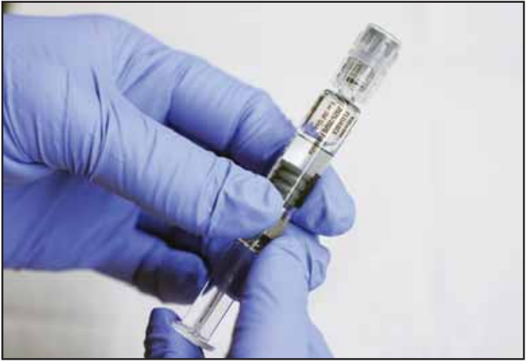
Clinic support supervisor May Fengmei Lin, CMA, displays a syringe of the Fluarix flu vaccine at International Community Health Services, Wednesday, Sept. 10, in Seattle.

For decades the most widely used pneumonia vaccine for adults was the so-called 23-valent vaccine, or PPSV23, which was approved in 1983 and protected against 23 strains of pneumococcal bacteria. In 2014, the PCV13 vaccine, which protected against 13 types of these bacteria, became the first pneumonia vaccine to be routinely recommended for adults age 65 and older.