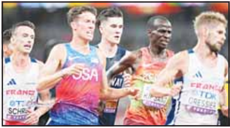
Norway's Jakob Ingebrigtsen, center, races in the men's 5,000 meters final at the World Athletics Championships in Tokyo.