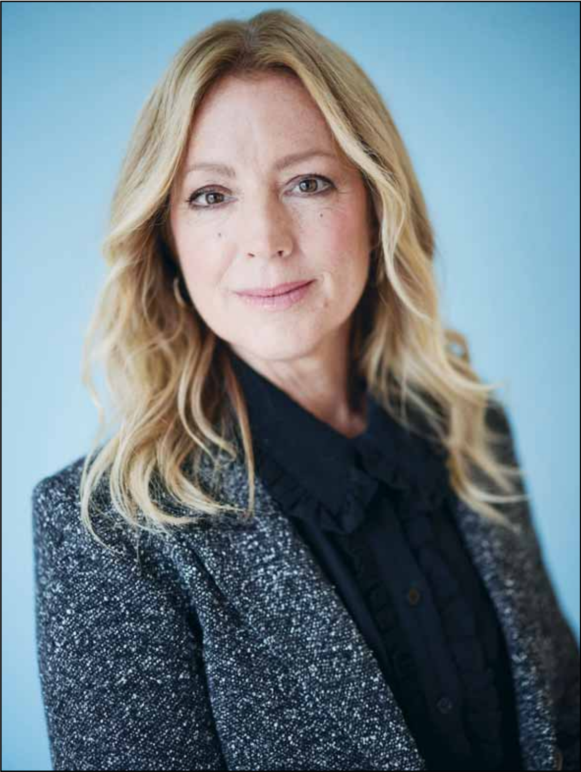
Sarah McLachlan poses for a portrait on Tuesday, Sept. 16, in New York.

And now I look at, you know, artists like Brandi Carlile, who are constantly championing women. Or Taylor Swift having women open up for her - Phoebe Bridgers and Boy-