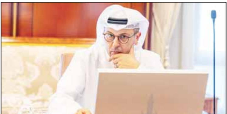
Minister of Electricity, Water and Renewable Energy, Minister of Finance and Acting Minister of State for Economic Affairs and Investment Dr. Subaih Al-Mukhaizeem