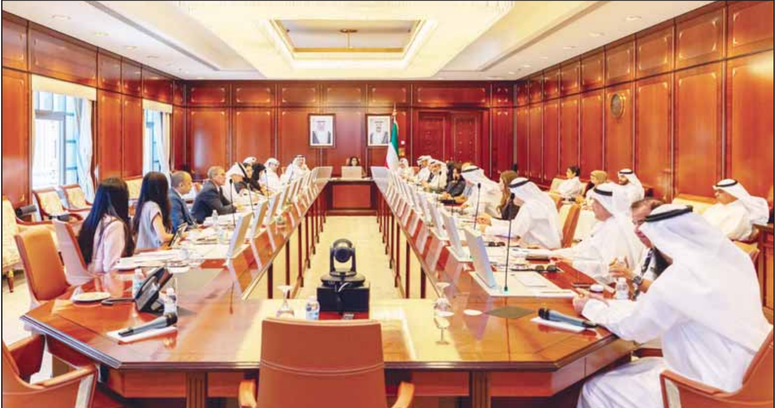
The Minister of Public Works, Dr. Noura Al-Mashaan chairs the meeting of the Cabinet Public Services Committee in the presence of ministers, members of the committee, leaders and officials of a number of concerned government agencies.