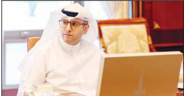
Minister of State for Municipal Affairs and Minister of State for Housing Affairs Abdullah Al-Mishari