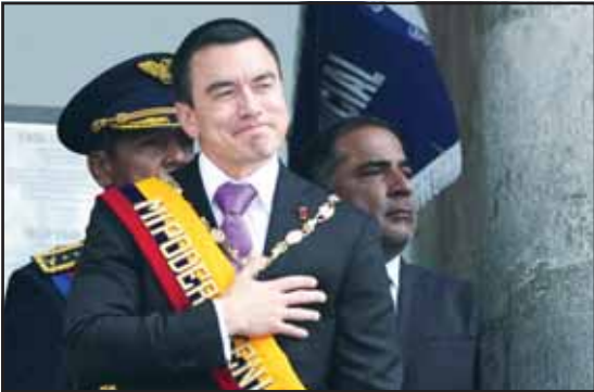
Ecuador’s President Daniel Noboa acknowledges supporters from the balcony of the presidential palace after his swearing-in ceremony for a second term in Quito, Ecuador on May 24.

Also: BOGOTA, Colombia: The YouTube account of Venezuelan President Nicolas Maduro was offline Saturday, with Venezuelan state-run channel Telesur claiming in a message on X that it was “eliminated” late the previous night without justification. YouTube’s parent company Google did not immediately respond to questions on the apparent termination of the Venezuelan president’s account. It comes amid rising tensions between Venezuela and the United States over the deployment of American warships and fighter jets in the southern Caribbean .