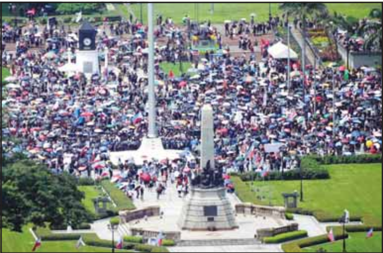
Protesters gather during an anti-corruption rally in Manila's Rizal Park, Philippines on Sept 21.

“Our purpose is not to destabilize but to strengthen our democracy,” Cardinal Pablo Virgilio David, the head of the Catholic Bishops’ Conference of the Philippines, said in a statement. He called on the public to demonstrate peacefully and demand accountability. President Ferdinand Marcos Jr. first highlighted the flood-control corruption scandal in July in his annual state of the nation speech. He later established an independent commission to investigate what he said