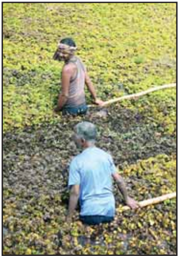
Laborers use bamboo poles to remove weeds from Doddajala Lake on the outskirts of Bengaluru, India, Saturday, Aug. 23, 2025.