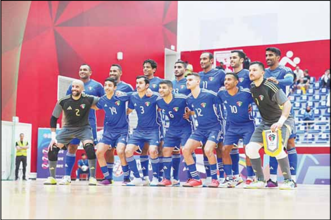
Kuwait futsal players pose for a group photo.