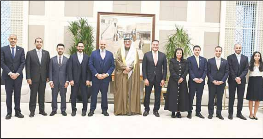
Representative of His Highness the Amir of the country, His Highness the Crown Prince, with a number of members of the State of Kuwait's permanent delegation to the United Nations and the support team participating in the 80th session of the United Nations General Assembly.

Artificial intelligence will be part of the major discussions during the high-level activity week specifically on September 25 when world governments will discuss the global framework for AI governance.