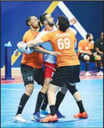
A Kuwait Club player finds himself trapped between two Kazma opponents.

earned the Best Player award. Esperance of Tunisia leads the championship's all-time winners list with seven titles, followed by Egypt's Al Ahly with five. Tunisia's Etoile du Sahel and Algeria's MC Oran have three each. Two titles each have been claimed by MC Alger (Algeria), Al-Ahli (Saudi Arabia), Club Africain (Tunisia), Al-Khaleej (Saudi Arabia), and Kuwait SC. Single-title winners include UAE's Al Ain, Qatar's Al Rayyan and Al-Gharafa, Egypt's Zamalek and Sporting, Bahrain's Al-Ahli, and Tunisia's Saaqiya Al-Zeit. Meanwhile, Kuwait's U-17 national handball team was eliminated from the first Asian U-17 Championship in Amman, Jordan, a qualifier for next month's World Cup in Morocco, following a 26-22 defeat to Qatar. The team had played four matches, winning its opener against Hong Kong but losing three, including two losses to Bahrain and Iran in the preliminary round.