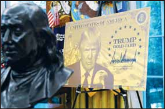
A poster showing the Trump Gold Card is pictured as President Donald Trump speaks in the Oval Office of the White House on Sept 19, in Washington.

tory, Delhi, on Saturday received bomb threats, prompting authorities to rush police teams and bomb disposal squads to these educational institutions, officials said. The threats turned out to be hoaxes, according to officials. Reports said students and staff members at some schools were evacuated as a precautionary measure. The incident comes amid a series of similar hoax threats targeting educational institutions and courts in the capital. NEW DELHI: One worker was killed and four others injured in a blast inside a chemical factory in the western Indian state of Maharashtra, officials said Friday. The explosion took place on Thursday evening at the factory in Palghar district, about 120 km north of Mumbai, the capital city of Maharashtra.