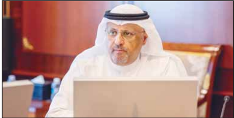
Minister of State for Communications Affairs Omar Al-Omar