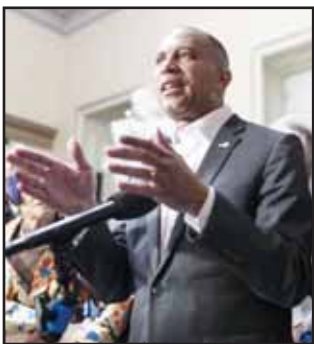
House Democratic Leader Hakeem Jeffries and Senate Democratic Leader Chuck Schumer (not seen) both of New York, tell reporters that they are united as the Sept. 30 funding deadline approaches, at the Capitol in Washington on Sept 11.

Trump, in an exchange with reporters on Saturday evening, suggested that he remains open to a potential meeting but was dismissive of the Democratic leadership. “I’d love to meet with them, but