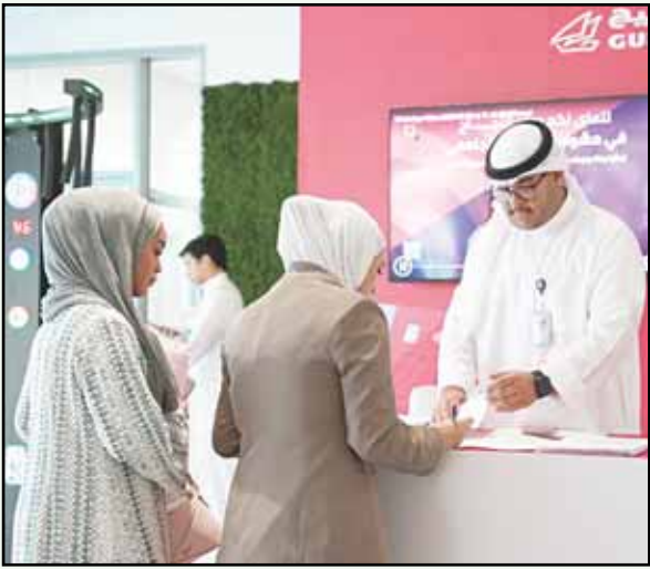
Students learn about the benefits of the red account.

KUWAIT CITY, Sept 21: Gulf Bank announced its sponsorship and participation in the orientation event for new students organized by the American University of Kuwait, as part of its ongoing commitment to engage with new students and introduce them to its banking services tailored specifically for youth. This initiative aligns with the bank's continuous efforts to support the educational journey and enhance financial literacy within the community. The Gulf Bank booth at the American University witnessed a strong turnout from students interested in learning more about the bank's services – particularly the red Account for youth and the red Plus pre-paid card, both specifically designed to meet the needs of individuals aged 15 to 25. These offerings provide numerous benefits that help students manage their finances efficiently from the very start of their academic journey.