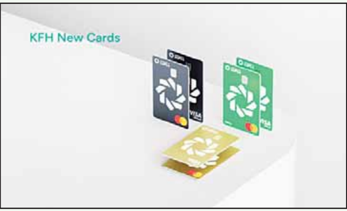
KFH cards displayed.

Additionally, cardholders can avail themselves of a 10% discount at Dabdood until December 31, 2025, and on all Tigro products until June 30, 2026. KFH aims to provide its credit cardholders with a variety of benefits and added value to boost customer loyalty and rewards. It also seeks to enhance the competitiveness of KFH’s cards by connecting them to numerous benefit programs and services that align with customers’ expectations. Furthermore, the range of discounts reflects KFH’s dedication to meeting the diverse interests of its customers. It is worth noting that KFH credit and prepaid cards are recognized as some of the best in the industry, receiving commendations from prominent companies such as Visa and Mastercard. In addition, KFH cards consistently earn awards for their excellence and efficiency within the banking sector.