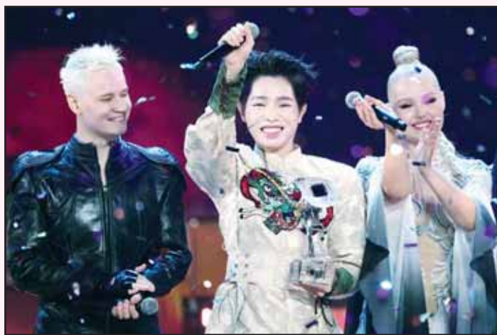
Vietnam's Duc Phuc, (center), celebrates after winning the International Music Competition 'Intervision' at the Live Arena outside Moscow, Russia, Sunday, Sept. 21, with Russia's SHAMAN, (left), and Belarus' Nastya Kravchenko.