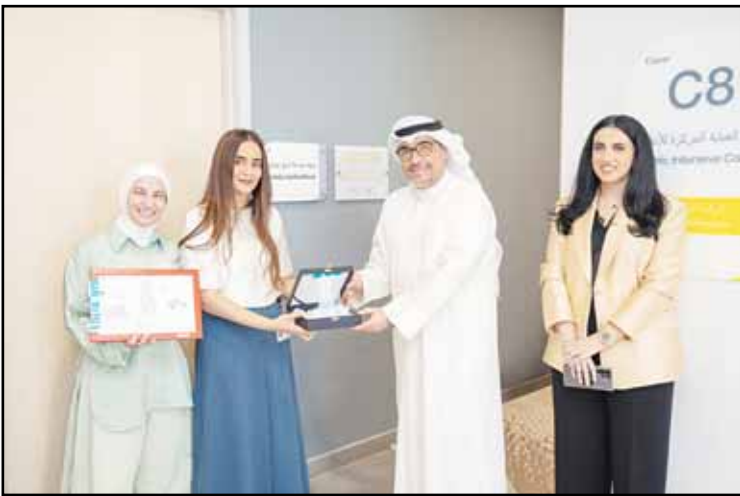
Praising Boursa Kuwait's continued commitment and support.