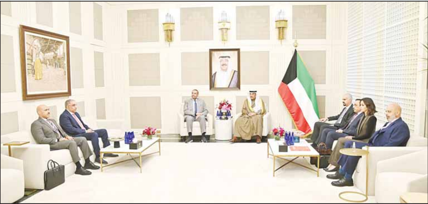
Representative of His Highness the Amir of the country, His Highness the Crown Prince Sheikh Sabah Khaled Al-Hamad Al-Sabah at the Permanent Headquarters of the State of Kuwait at the United Nations in New York.