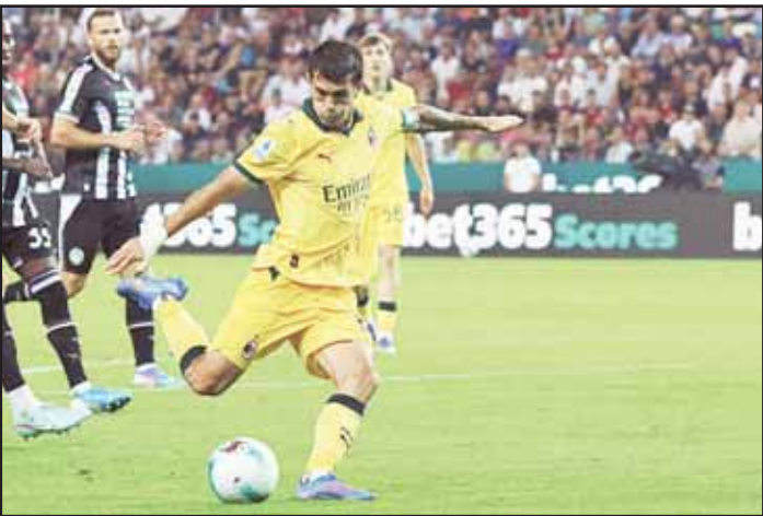
AC Milan’s Christian Pulisic scores his team’s third goal during the Serie A soccer match between Udinese and AC Milan at the Bluenergy Stadium in Udine, Italy.

ROME, Sept 21, Stripped of the captaincy. His contract nearing expiration without a renewal proposal. No minutes played in the opening three matches. Nothing seemed to be going Lorenzo Pellegrini’s way. Until the Rome derby. The Roman-born Pellegrini cast aside all the issues surrounding him and scored the decisive goal for Roma in a 1-0 win over Lazio in Serie A on Sunday. After being derided by Gian Piero Gasperini a day earlier when Roma’s new coach said that at 29 Pellegrini has “got to become an athlete and start running,” the midfielder was perfectly positioned to strike from the center of the area after Dwayne Rensch had stripped the ball from Lazio left back Nuno Tavares and rolled it across to the ex-captain. Pellegrini, who is also trying to regain his spot in Italy’s squad, celebrated with a kiss toward the Curva Sud where Roma’s hard-core “ultra” fans sit. Moments before the goal, a banner popped up in the Curva Sud that said, “Welcome back, captain.” After the goal, Roma’s end of the Stadio Olimpico erupted with yellow-and-red smoke bombs.