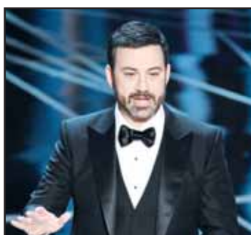
Host Jimmy Kimmel speaks at the Oscars in Los Angeles on Feb. 26, 2017.

in real freedom or the Constitution and free speech, this is it," said the stand-up comedian and podcaster Marc Maron.