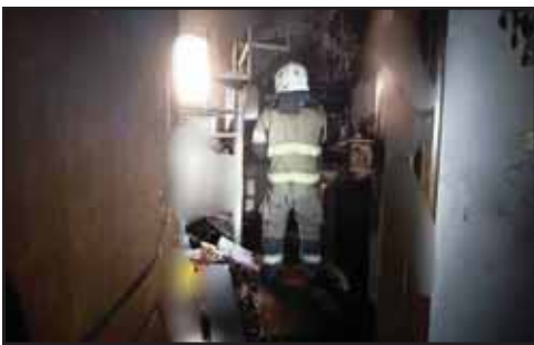
KFF extinguishes Rawda house fire.

By Munif Naif Al-Seyassah/Arab Times Staff KUWAIT CITY, Sept 21: The General Traffic Department in the Interior Ministry recorded a remarkable decline in the number of juveniles caught driving without a license. This development reflects the success of intensive traffic campaigns aimed at controlling traffic behavior and reducing violations. The newspaper obtained information that the number of juveniles caught driving without a license last week totaled 18, far from the 70 per week recorded in previous weeks. According to the weekly statistics of the department, traffic campaigns resulted in recording 31,643 various violations, impoundment of 39 vehicles, referral of 34 individuals to the traffic police station, seizure of 75 wanted vehicles, and arrest of 53 violators of Residency and Labor laws. Patrols also dealt with 1,282 traffic accidents resulting in 236 injuries, confirming that the speed of intervention and the accuracy of procedures contributed to reducing the losses and injuries resulting from such accidents.