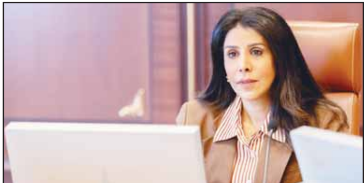
Minister of Public Works and the committee Chairperson, Dr. Noura Al-Mashaan