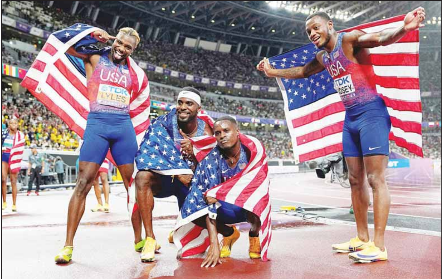
United States' Noah Lyles, Kenneth Bednarek, Christian Coleman and Courtney Lindsey celebrate taking gold in the men's 4x100 meters relay final at the World Athletics Championships in Tokyo.