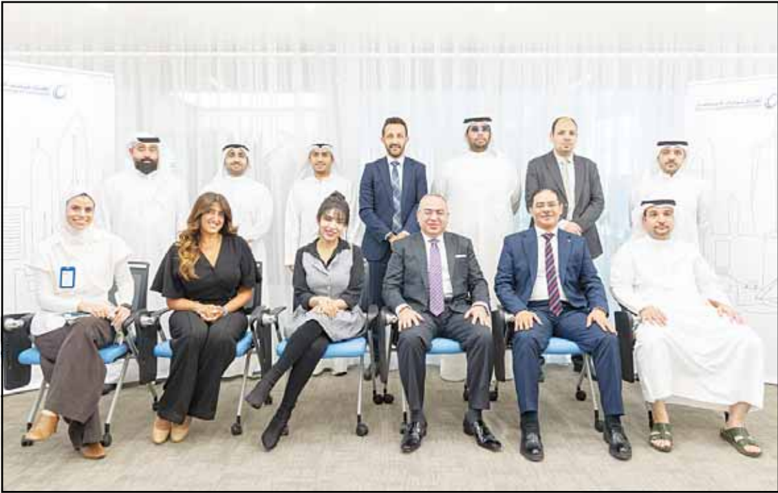
Photo during the training session.

fast-paced lifestyles, in addition to supporting educational initiatives that contribute to building a more aware and sustainable society. Gulf Bank's vision is to be Kuwait's leading bank by engaging its employees in an inclusive and diverse work environment to deliver exceptional customer service while maintaining a strong commitment to sustainable community service. Thanks to its wide network of branches and innovative digital services, the bank enables its customers to choose how and where they complete their banking transactions—ensuring a smooth and fast banking experience. As part of its support for Kuwait Vision 2035 – “New Kuwait”, and its dedication to collaborating with various stakeholders to achieve it, Gulf Bank remains committed to driving significant progress in sustainability across environmental, social, and governance (ESG) levels through strategically selected initiatives both within and outside the bank.