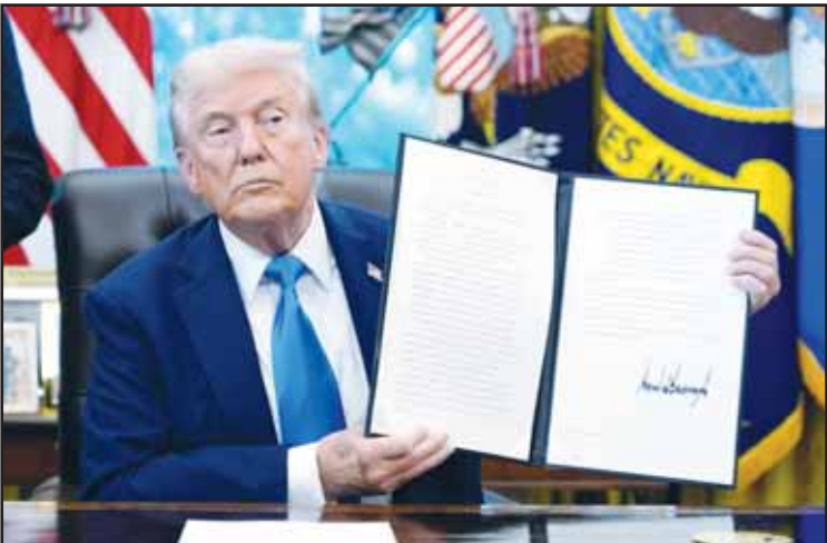
US President Donald Trump holds up the signed Gold Card executive order in the Oval Office of the White House on Sept 19, in Washington.

But immigration attorneys said that the White House move threatened to