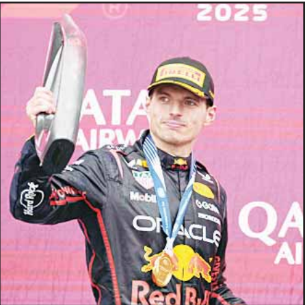
Red Bull driver Max Verstappen of the Netherlands stands on the podium after winning the Azerbaijan Formula One Grand Prix in Baku, Azerbaijan.

BAKU, Azerbaijan, Sept 21, Max Verstappen looked to be back at his title-winning best. McLaren’s title-chasing drivers looked like also-rans. Verstappen cruised to victory in the Azerbaijan Grand Prix on Sunday as championship leader Oscar Piastri’s first-lap crash allowed Lando Norris to trim his Formula 1 points advantage - but not deal a decisive blow. Verstappen was in control from start to finish after taking pole position in a chaotic qualifying session Saturday and had a vast lead by the time he made his only pit stop. “The car was working really well,” Verstappen said. “It was pretty straightforward. Of course, it’s not easy around here, very windy today so the car is always moving around a little, but of course, incredibly happy with this performance.” George Russell said he was “pretty glad” to see the checkered flag after taking second for Mercedes while battling illness and Carlos Sainz, Jr. was third for Williams’ first podium finish in four years. “Best podium in my career,” the former Ferrari driver told the team. Verstappen made it back-to-back wins for the first time since the Spanish Grand Prix of June 2024 as McLaren’s dominance this season came under threat for the second race in a row. Norris was seventh as he missed the chance to fully exploit Piastri’s error and slash the Aus