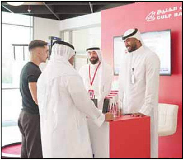
Bank employees explain to students the benefits of Gulf Bank accounts.