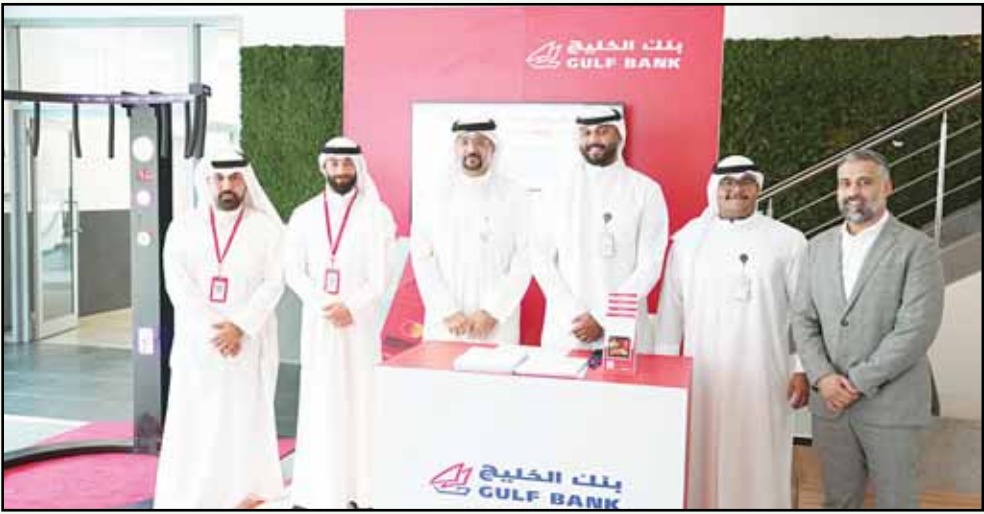
A group photo of the Gulf Bank team.