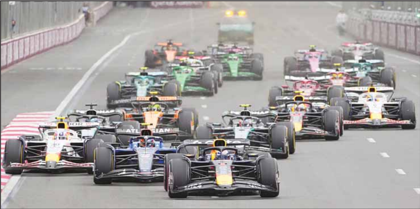
Red Bull driver Max Verstappen of the Netherlands leads at the start of the Azerbaijan Formula One Grand Prix in Baku, Azerbaijan.