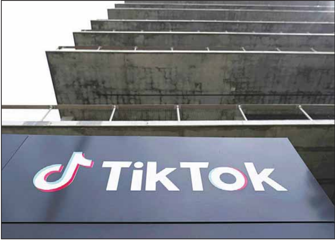
The TikTok Inc. building is seen in Culver City, Calif., March 17, 2023.

Leavitt, in a Fox News “Saturday in America” interview, said “the algorithm will also be controlled by America as well,” offer-