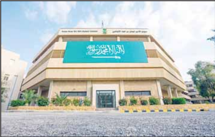
Overview of Riyadh’s Prince Faisal bin Fahd Sports City.

RIYADH, Sept 21: Riyadh, the capital of Saudi Arabia, is set to host the sixth edition of the Islamic Solidarity Games from November 7 to 21, 2025. Over 3,000 athletes from 57 member states of the Organization of Islamic Cooperation are expected to participate, as the city showcases its top sports facilities and modern landmarks to deliver a world-class sporting experience. The Games will take place across a mix of Olympic stadiums, open fields, and state-of-the-art entertainment venues, offering athletes and spectators a unique combination of high-level competition and spectacular event organization. Prince Faisal bin Fahd Sports City stands out as one of Riyadh’s premier sporting venues, renowned for hosting major competitions with its advanced facilities and comprehensive infrastructure. Renovations have prepared the complex to host both regional and international championships. In the 2025 edition, it will host athletics, para-athletics, judo, karate, taekwondo, and jiu-jitsu events, making it a central hub for Olympic sports and martial arts. An additional integrated sports complex will provide stadiums, indoor arenas, and training facilities, catering to a variety of competitions and reflecting Saudi Arabia’s commitment to modern sports infrastructure. During the Games, this venue will also host futsal, handball, and swimming events, positioning it as a key location for both team and aquatic sports.