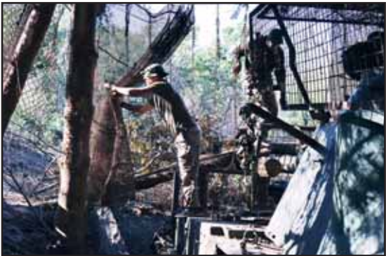
In this photo provided by Ukraine’s 65th Mechanized Brigade on Sept 20, Ukrainian soldiers camouflage an artillery vehicle after firing toward Russian positions at the frontline in Zaporizhzhia region, Ukraine.