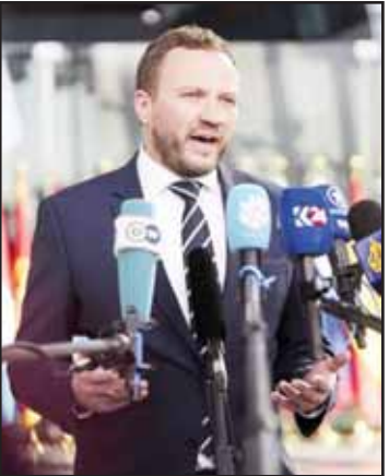
Estonia’s Foreign Minister Margus Tsahkna speaks with the media as he arrives for a meeting of NATO foreign ministers at NATO headquarters in Brussels on April 3.

The Russian MIG-31 fighters entered Estonian airspace between 9:58