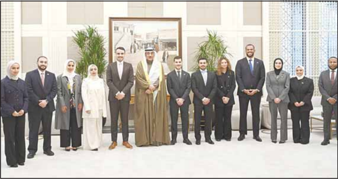
Crown Prince Diwan photos