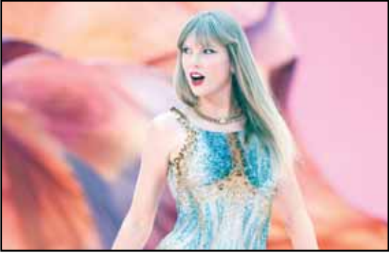
Taylor Swift performs at Wembley Stadium as part of her Eras Tour, June 21, 2024, in London.

“The Life of a Showgirl” follows last year’s “The Tortured Poets Department” and Swift’s record-breaking tour, which raked in over $2.2 billion across two years and five continents, making it the highest-grossing tour of all time.