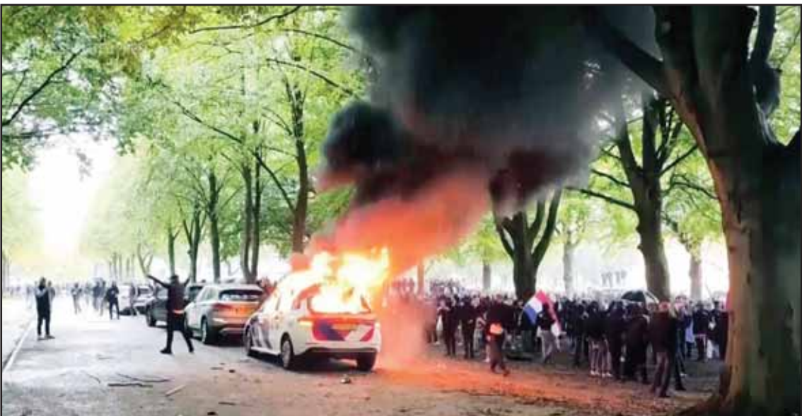
A police vehicle burns as a right-wing demonstration erupted into violence and chaos as rioters clashed with police on Sept 20, in The Hague, Netherlands.

But although they acknowledged communication from the Italian pilots flying F-35 fighter jets, they apparently ignored it and “didn’t actually follow the signs,” which is partly why they were in Estonian airspace for so long, he added.