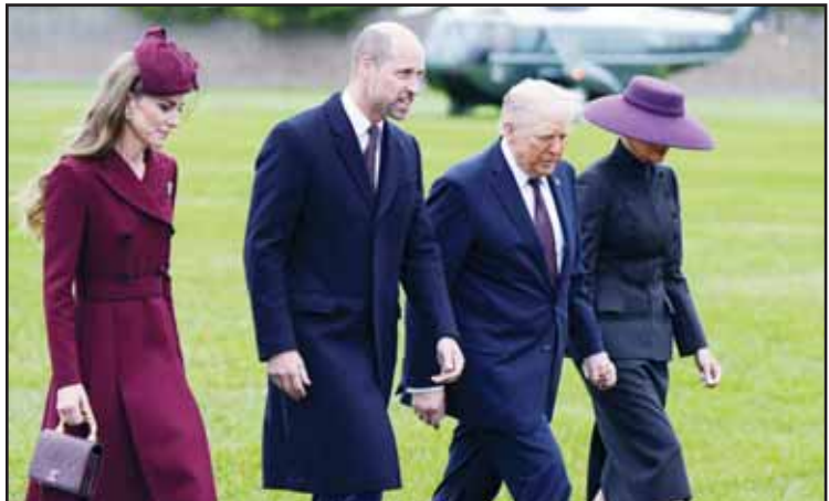
Britain’s Prince William and Kate, Princess of Wales, (left), receive US President Donald Trump and First Lady Melania Trump at Windsor Castle in Windsor, England, on Sept 17.

WINDSOR, England, Sept 17, US President Donald Trump was greeted by royalty, military honor guards and mounted troops in red and gold as he arrived at Windsor Castle on Wednesday to begin a two-day state visit to Britain as the guest of King Charles III. Prince William and his wife Catherine met the president’s Marine One helicopter as it landed in the private Walled Garden on the vast castle estate, walking the president and first lady Melania Trump over to be greeted by the king and Queen Camilla. The guests traveled to the castle in a procession of horse-drawn carriages, past ranks of soldiers, sailors and aviators, as military bands played the US and British national anthems. The king and president chatted in the Irish State Coach during the short journey to the castle quadrangle, where Trump, accompanied by Charles, inspected an honor guard of soldiers in red tunics and bearskin hats. The day of royal pageantry is the highlight of the president’s unprecedented second state visit to Britain. And it’s on a scale designed to impress the grandeur-loving president, involving some 120 horses and 1,300 troops, including the largest guard of honor in living memory. It’s a spectacle with a purpose: to bolster ties with a world leader known