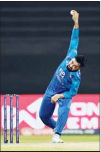
Afghanistan's Rashid Khan bowls a delivery during the Asia Cup Cricket match between Bangladesh and Afghanistan at Zayed Cricket Stadium in Abu Dhabi, United Arab Emirates.

ABU DHABI, United Arab Emirates, Sept 17, Bangladesh notched a thrilling eight-run victory over Afghanistan in a must-win game and stayed alive for the Super 4 stage of Asia Cup. Afghanistan now needs to beat Group B leader Sri Lanka in its last group game as three teams are still in contention to get the final two spots for the next round. Bangladesh spinners Nasum Ahmed (2-11) and Rishad Hossain (2-18) stifled Afghanistan's top-order batters before left-arm fast bowler Mustafizur Rahman (3-28) knocked out the tailenders in the death overs to bowl out the opposition for 146 off the final ball. Earlier, Afghanistan slow bowlers also squeezed Bangladesh in the middle-overs with Noor Ahmad and