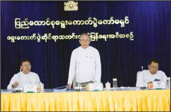
Khin Maung Oo, (center), a member of the Union Election Commission, speaks to journalists during a press conference at the Union Election Commission (UEC) in Naypyitaw, Myanmar on Sept 11.

In addition, the UEC announced that international observers will also be allowed to monitor the election. Invitations will be extended directly to representatives of relevant countries and international organizations. Through the Ministry of Foreign Affairs, invitations will also be sent to foreign embassies, consul-