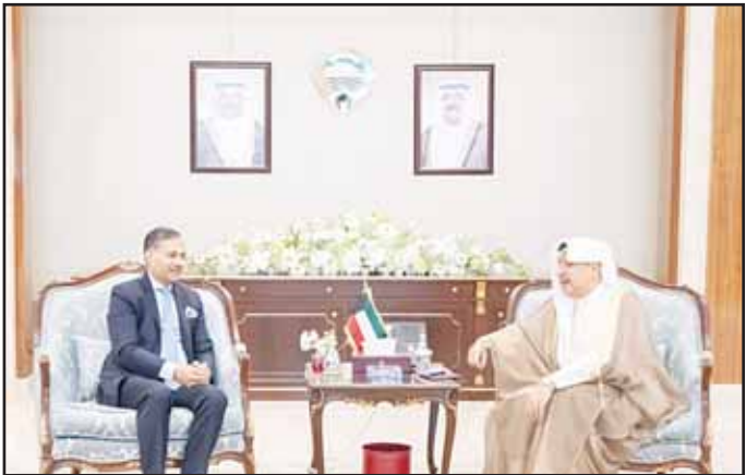
Minister of the Amiri Diwan Affairs receives the Indian ambassador (left) and the representative of the Sultan of Bohra.