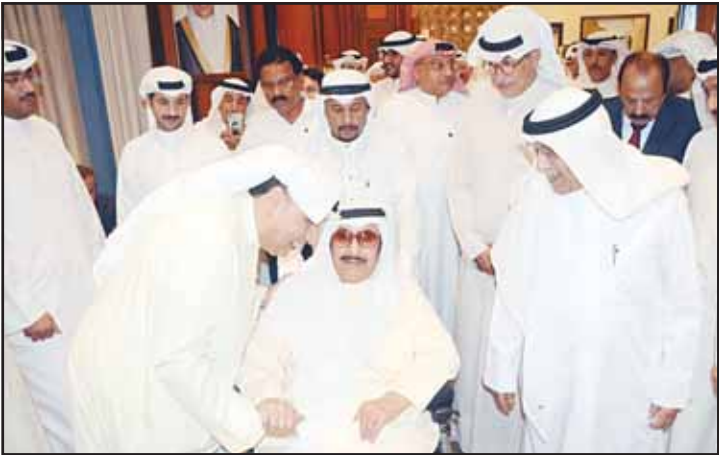
Dignitaries, diplomats attend resumed Diwan of Amiri Diwan Affairs Minister.