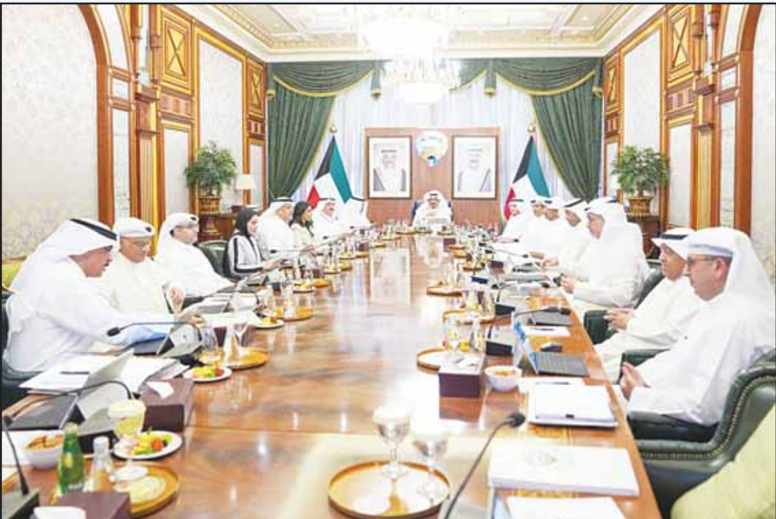
His Highness the Prime Minister Sheikh Ahmad Abdullah Al-Ahmad Al-Sabah chairs the weekly Cabinet meeting on Tuesday.