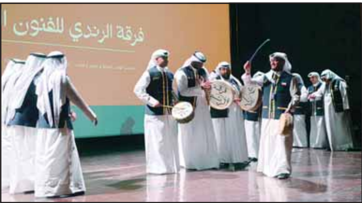
Left: The Kuwaiti Al-Randi Folk Arts Troupe presents a distinctive heritage show. Right: Part of the guests' tour of the art gallery.

He added that the cultural journey in Kuwait and the UAE embodies the