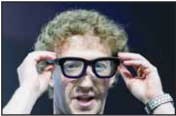
Mark Zuckerberg wears a pair of Orion AR glasses during the Meta Connect conference on Sept. 25, 2024, in Menlo Park, Calif.