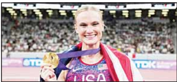
United States' Katie Moon celebrates after winning the women's pole vault final at the World Athletics Championships in Tokyo.