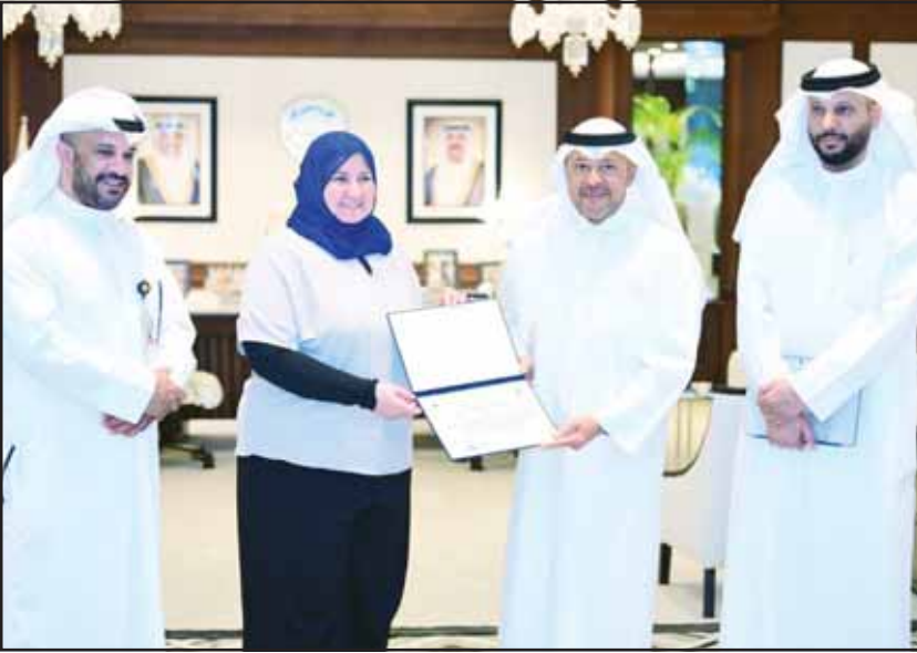
Farwaniya Governor photo Farwaniya Governor Sheikh Athbi honors nurse for life-saving act.

The committee informed about the letter of a group of real estate developers regarding proposals related to the building regulations, and the letter of the concerned party regarding the proposed amendment of Decree No. 119/2010 on the system for sorting and merging plots in private residential, investment, commercial, coastal, industrial and craft areas.