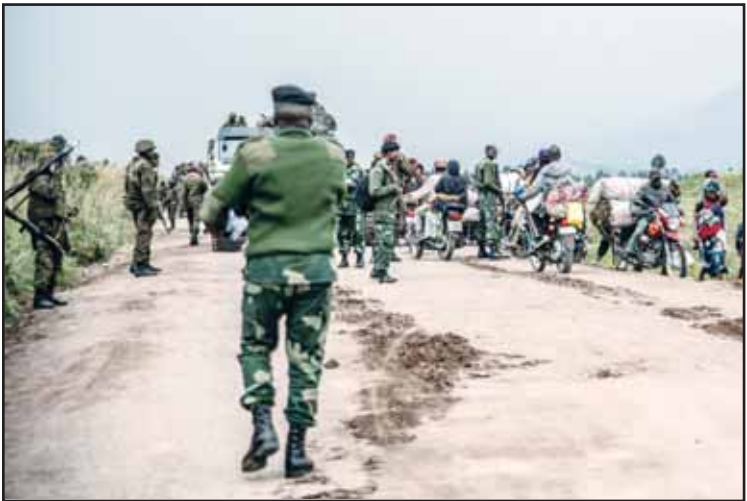
People walk on the road near Kibumba, north of Goma, Democratic Republic of Congo, as they flee fighting between Congolese forces and M23 rebels in North Kivu on May 24, 2022.

The M23 said the recruits included Congolese soldiers who surrendered