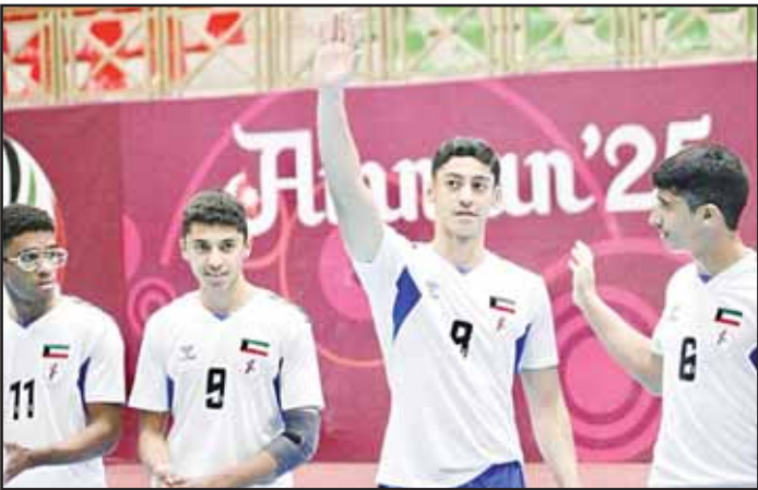
Kuwait Club celebrates its victory.

The team had opened the tournament with a dominant 48-21 win over Hong Kong, securing second place in the group alongside Bahrain and moving on to the next stage. To prepare for the Asian Championship, the team held an overseas training camp in Croatia and Slovenia, followed by a local preparation period. The squad of 18 play-