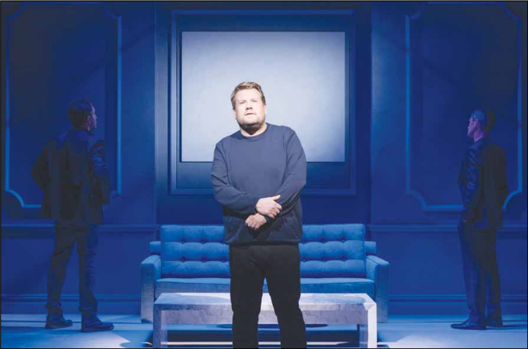
This image released by Polk & Co. shows James Corden during a performance of ‘Art’ at the Music Box Theatre in New York. (AP)