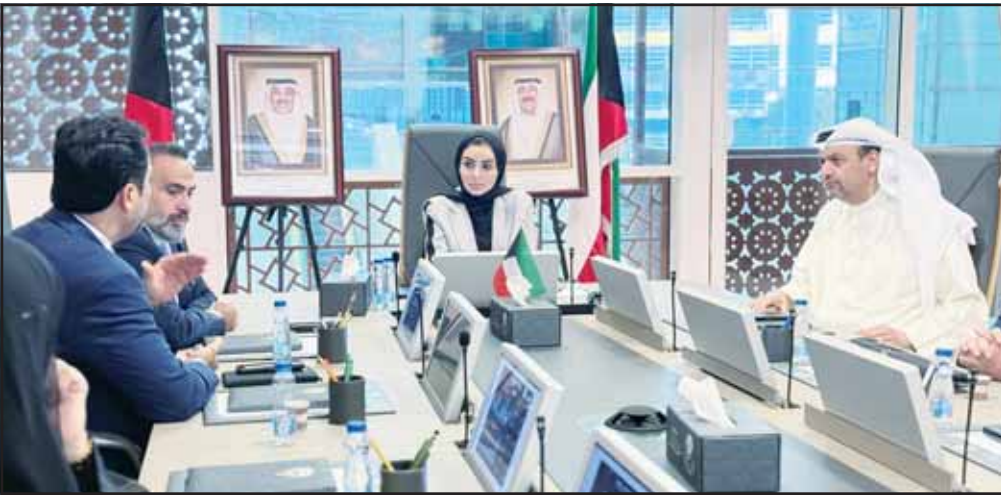
The Minister of Social Affairs during her meeting with the contracting company to discuss the implementation of the strategic stock linking project.

She stressed that these measures would significantly raise levels of accuracy and transparency in stock management, enabling the ministry and cooperatives to better coordinate, avoid discrepancies, and strengthen oversight mechanisms across multiple operational and administrative levels nationwide.