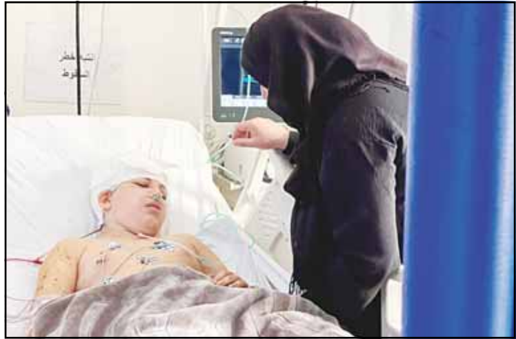
A boy injured in an Israeli attack receives treatment at a hospital in Nabatieh, southern Lebanon, on Sept. 16, 2025. The Israeli military said late on Monday it struck a Hezbollah command site in southern Lebanon, as cross-border tensions persist despite a ceasefire.

The FDA also posted separate warning letters to manufacturers of the so-called GLP-1 drugs, taking issue with a 2024 infomercial featuring Oprah Winfrey. Regulators said the 42-minute TV segment from Eli Lilly and Novo Nordisk gave a “misleading impression” about the safety of Zepbound, Wegovy and similar “drugs with multiple serious, potentially life-threatening risks.” Health Secretary Robert F. Kennedy Jr. has long been a critic of the pharmaceutical industry, including GLP-1 drugs, and previously suggested Americans can reverse obesity with diet and exercise alone. A memo signed by President Donald Trump last week directed Kennedy and the FDA to ensure that pharmaceutical ads on TV, social media and other websites are “truthful and non-misleading.” The new FDA letters each contain