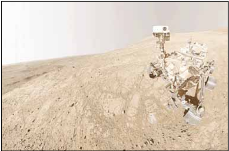
This image provided by NASA shows Perseverance taking a selfie on May 10, 2025.

entists build mental models of Martian landscapes - models they then communicate to the world through scientific publications. Five primary instruments on Perseverance, aided by machine learning algorithms, helped describe the unusual rock formations at a site called Beaver Falls and the past they record. Robotic hands: Mounted on the rover’s robotic arm are tools for blowing dust aside and abrading rock surfaces. These ensure the rover analyzes clean samples. Cameras: Perseverance hosts 19 cameras for navigation, self-inspection and science. Five science-focused cameras played a key role in this study. These cameras captured details unseeable by human eyes, including magnified mineral textures and light in infrared wavelengths. Their images revealed that Bright Angel is a mudstone, a type of sedimentary rock formed from fine sediments deposited in water. Spectrometers: Instruments such as SuperCam and SHERLOC - scanning habitable environments with Raman and luminescence for organics and chemicals - analyze how rocks reflect or emit light across a range of wavelengths. Think of this as taking hundreds of flash photographs of the same tiny spot, all in different “colors.” These datasets, called spectra, revealed signs of water integrated into mineral