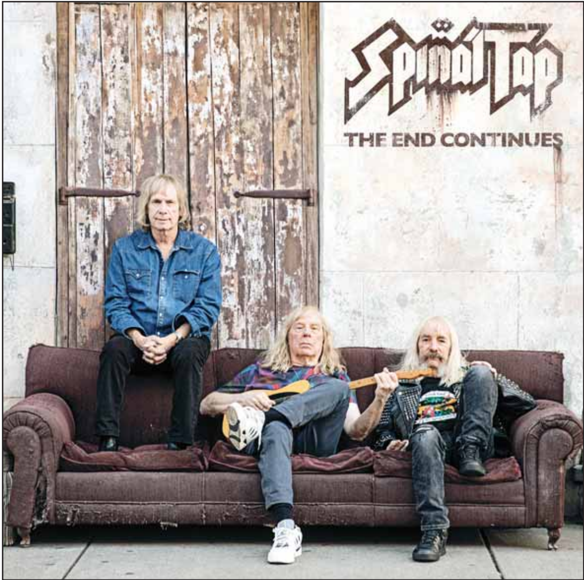
This cover image released by Interscope Records shows ‘The End Continues’ by Spinal Tap.