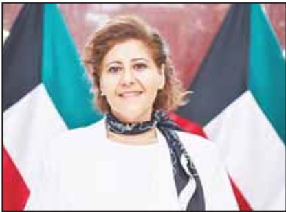
Assistant Foreign Minister for Human Rights, Ambassador Sheikha Jawaher Al-Duaij Al-Sabah

KUWAIT CITY, Sept 17, (KUNA): Assistant Foreign Minister for Human Rights, Ambassador Sheikha Jawaher Al-Duaij Al-Sabah affirmed on Wednesday that combating human trafficking and protecting victims are a priority that reflects Kuwait's commitment to its humanitarian values and international agreements.