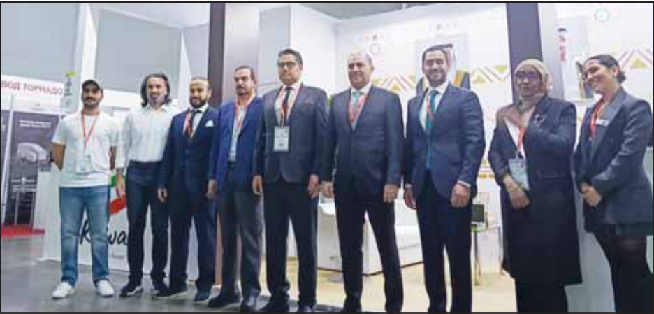
Kuwait Pavilion at the Moscow International Food Exhibition.

MOSCOW, Sept 17, (KUNA): Kuwait's participation in the WorldFood Moscow exhibition 2025 shows the state's commitment to supporting and encouraging national industries and enhancing their competitiveness in foreign markets, Deputy Director General of the Export Development Sector at the Public Authority for Industry said on Tuesday.