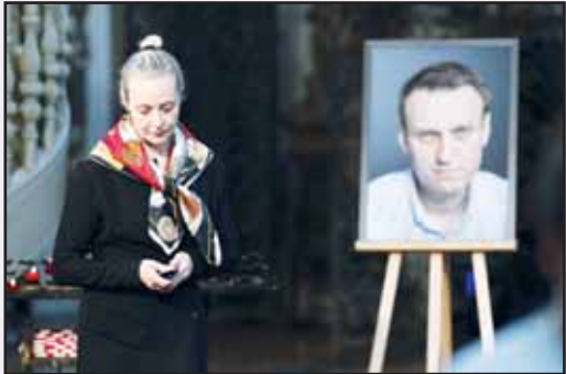
Yulia Navalnaya, widow of Russian opposition leader Alexei Navalny walks away from his picture after lighting a candle at the end of a service in St. Mary’s Church on the occasion of his birthday, in Berlin, June 4, 2024.