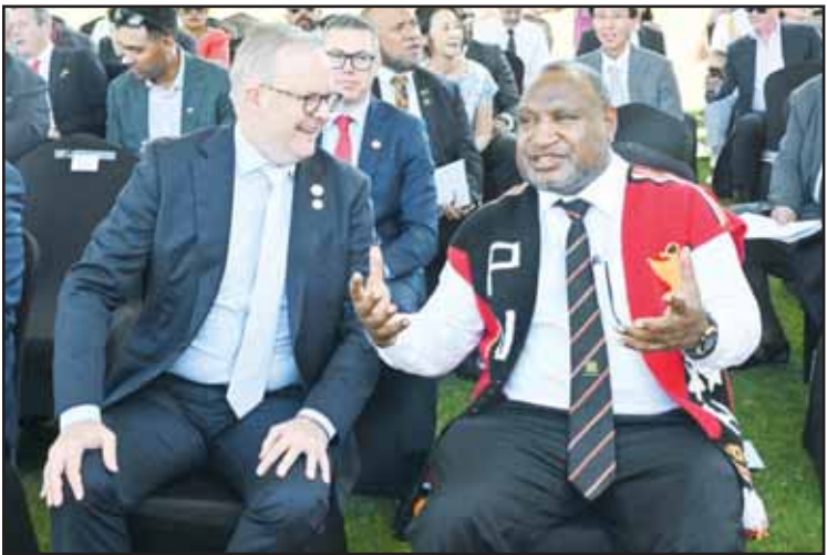
Australia’s Prime Minister Anthony Albanese, (left), and Papua New Guinea’s Prime Minister James Marape attend a flag lowering ceremony in Port Moresby, Papua New Guinea on Sept 16. (AP)

Albanese had similarly expected to sign a bilateral security and economic treaty during a visit to Vanuatu on Sept. 9, but left the country with an assurance that negotiations would con-