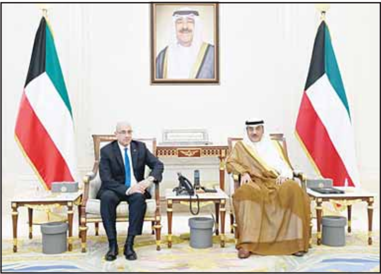
His Highness the Crown Prince receives the Tunisian Minister of Defense.