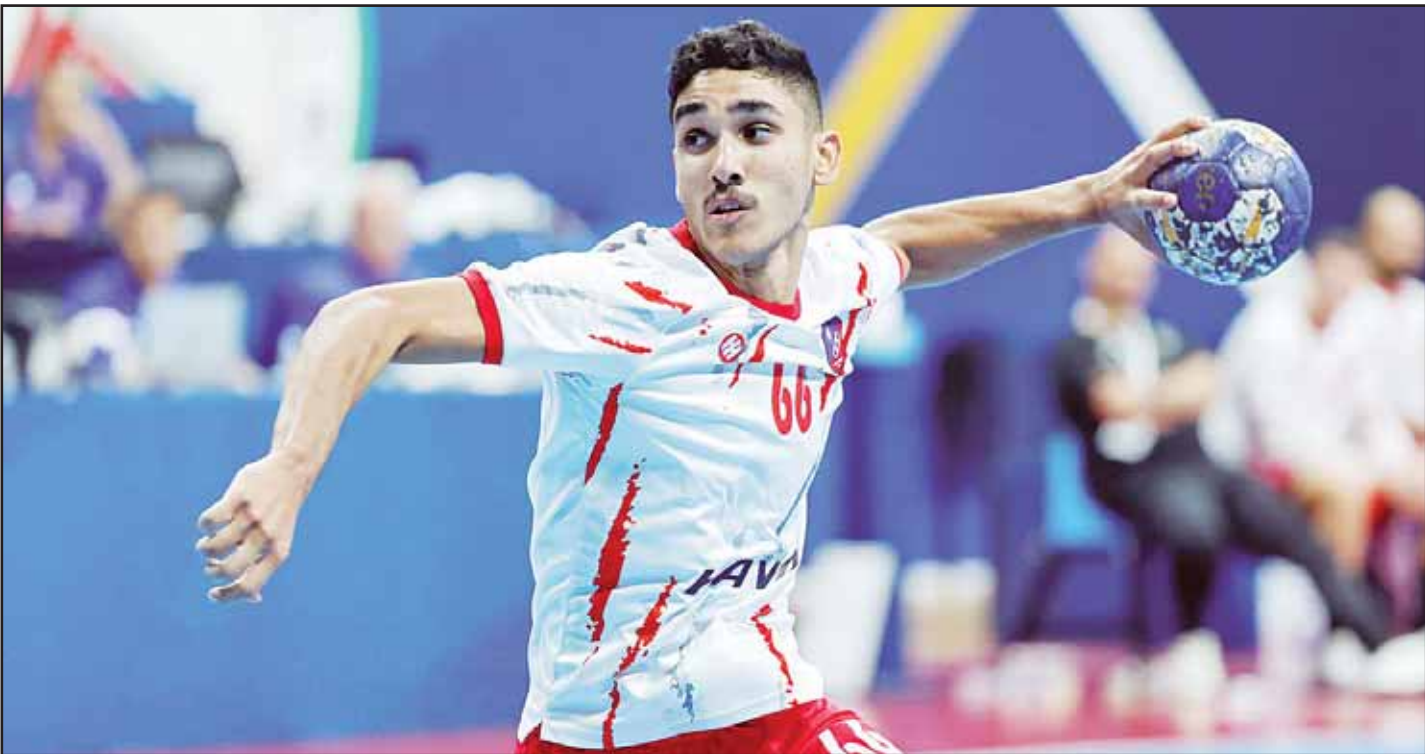
Kuwait player unleashes a powerful shot on goal during the match.

Kuwait Club stays unbeaten with fourth win