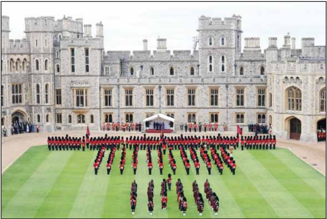
US President Donald Trump, Britain’s King Charles III, Queen Camilla and Melania Trump, (center), review the Guard of Honour at Windsor Castle in Windsor, England, on Sept 17.

to a period of 10 years. This is estimated to save about 4.4 million euros ($5.21 million) per year. Trade unions have called for nationwide strikes and protests on Thursday, scheduled before the change of prime minister, to push back on what they see as austerity policies. Unions reject cuts in social spending, arguing French workers have been deeply affected by rising prices in recent years. They also continue to protest against Macron’s pension reform that raised the minimum retirement age from 62 to 64. Thursday’s strikes are expected to prompt disruption in sectors like transport, public services, hospitals and schools. They may sound a stark warning for Lecornu. Last week, thousands of protesters rallied across France last week for a day of nationwide action against Macron’s policies under the slogan “Block Everything.” Mathieu Gallard, account director at Ipsos France polling institute, says a series of opinion polls show French voters’ main concerns focus on their declining purchasing power and the deterioration of once-generous social benefits, including health care, pensions and public services. “The political situation gives the French the feeling leaders are not able to remedy the situation due to that instability,” Gallard told The Associated Press.