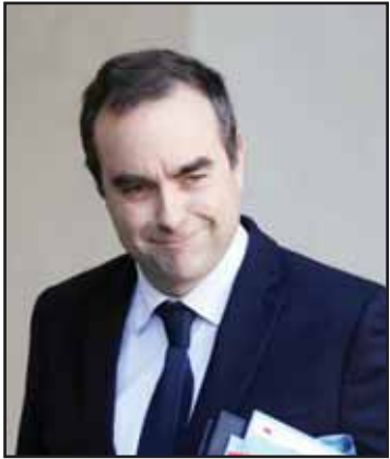
French Defense Minister Sébastien Lecornu leaves the first cabinet meeting of the new government, at the Elysee Palace in Paris on Jan 3.

PARIS, Sept 17, A ballooning deficit. A fractious Parliament. Unrest on the streets. The challenges facing Sébastien Lecornu, France’s fourth prime minister in a year, are daunting and defeated his immediate predecessors. So he’s trying a different tack. To ease tensions, Lecornu has scrapped proposals to axe two public holidays and trimmed lifetime benefits for former government ministers. A loyal ally to unpopular centrist President Emmanuel Macron, he began meeting with opposition leaders and trade unions this week. But pitfalls lie ahead. Opponents aim to turn up the heat yet further on Thursday with nationwide strikes and protests against budget cuts and other complaints targeting Lecornu’s fragile minority government. French politics have been in turmoil since Macron called early parliamentary elections in June last year which resulted in a deeply fragmented legislature. One major challenge looms: addressing France’s budget crisis, a deeply divisive issue in Parliament. Lecornu’s first big move has been to dismiss the idea of cutting two public holidays, championed by his immediate predecessor, whose government fell earlier this month. François Bayrou had stirred public anger with his plan to scrap the Easter Monday and Victory Day (May 8) holidays, a