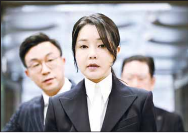
South Korea’s former first lady Kim Keon Hee, wife of impeached former president Yoon Suk Yeol, arrives at a court to attend a hearing to review her arrest warrant requested by special prosecutors, in Seoul, South Korea, on Aug 12.

Truck crash leaves 3 dead in central Vietnam: A truck crashed into a market in central Vietnam’s Quang Tri province on Wednesday, leaving at least three people dead and several others injured, the local newspaper Tuoi Tre (Youth) reported.