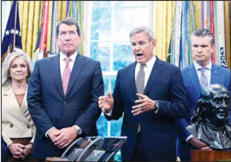
Tennessee Gov Bill Lee speaks as Sen Marsha Blackburn, R-Tenn., (from left), Sen Bill Hagerty, R-Tenn., and Defense Secretary Pete Hegseth listen during a memorandum signing with President Donald Trump in the Oval Office of the White House on Sept 15, in Washington.

vices Committee. It added that “these actions are inherently law enforcement actions that may not be performed by members of the armed forces.” “We remain extremely disturbed about the impacts on readiness of using military personnel to perform what are traditionally Department of Justice functions,” the letter says. The nation’s immigration courts - with a backlog of about 3.5 million cases - have become a key focus of President Donald Trump’s hard-line immigration enforcement efforts. Since Trump returned to office, dozens of immigration judges have been fired, while others have resigned or taken early retirement. The senators’ letter, sent to the offices of the top military lawyers for the four services on Monday, is asking the Pentagon to say where the roughly 600 lawyers will be coming from and for insight into what legal analysis the military has conducted into whether the move would violate the Posse Comitatus Act. That law prevents the military from conducting law enforcement outside of extreme emergencies. A Pentagon memo that described