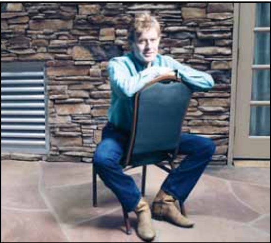
Robert Redford poses for a portrait during the Sundance Film Festival in Park City, Utah, on Jan. 21, 2010.

ford’s death “a huge loss to our community” and cited his legacy an actor and activist. “More so than anything, he was a staunch environmental leader,” DiCaprio said Monday. In 2013, Redford joined with then-Gov. Bill Richardson to create the Foundation to Protect New Mexico Wildlife to fight efforts by a Roswell, New Mexico, company and oth-