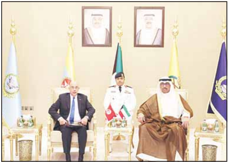
The Minister of Defense discusses common issues with his Tunisian counterpart.