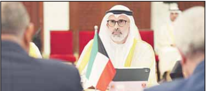
Deputy Prime Minister Ambassador Sheikh Jarrah Jaber Al-Ahmad Al-Sabah chaired the Kuwaiti delegation to the meeting.

region, as it includes the latest specialized devices for measuring gamma, alpha, and beta radiation, and advanced systems for monitoring radon gas in the air, water, and soil, in addition to laboratories for preparing environmental samples according to the highest standards. He said that the laboratory applies a quality system that complies with the standard specification (ISO/IEC 17025) to ensure the accuracy and reliability of results, and regularly participates in the ALMERA International Comparison Program, which is organized annually by the IAEA, which enhances the reliability of its data and confirms its position as an accredited regional scientific reference. Al-Humaidan concluded his remarks by saying that through this scientific achievement, Kuwait seeks to serve its country and enhance its regional standing under the wise leadership of His Highness the Amir of Kuwait, His Highness the Crown Prince, and His Highness the Prime Minister.