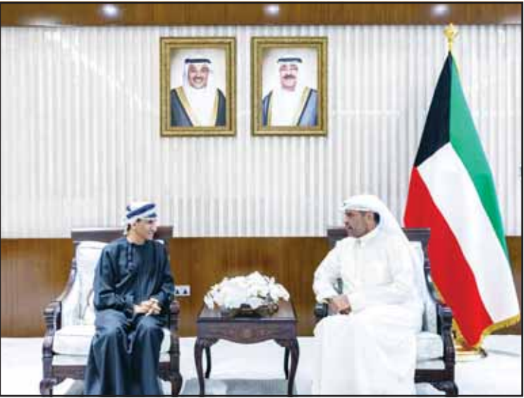
The Minister of Foreign Affairs receives the Special Representative of the Secretary-General of the United Nations in Iraq.