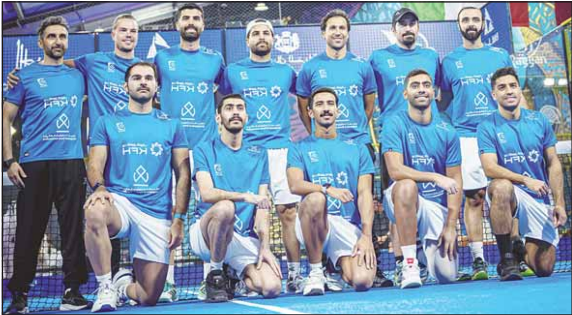
The men's team pose for a group photo.