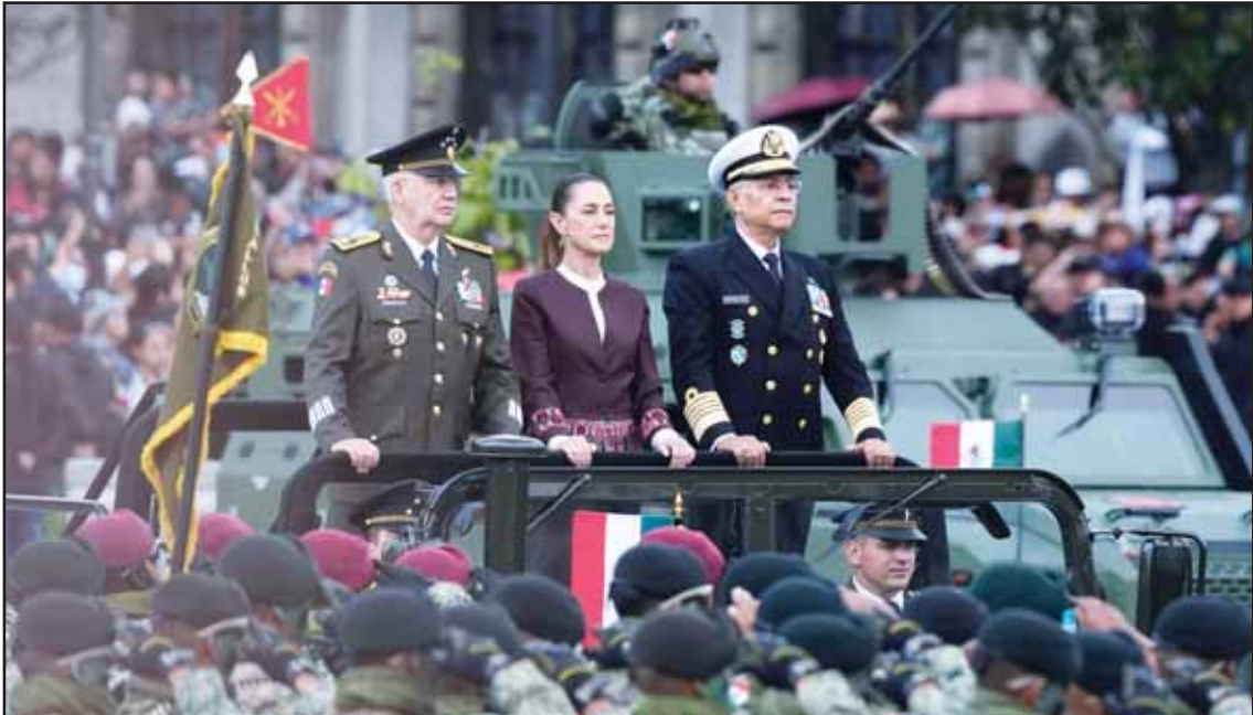
Mexican President Claudia Sheinbaum rides through the annual Independence Day military parade, in Mexico City on Sept 16.

“Processes are important and sovereignty’s important and we respect it and Papua New Guinea will go through its Cabinet processes, but we have ... agreed on the words in this treaty,” he added.