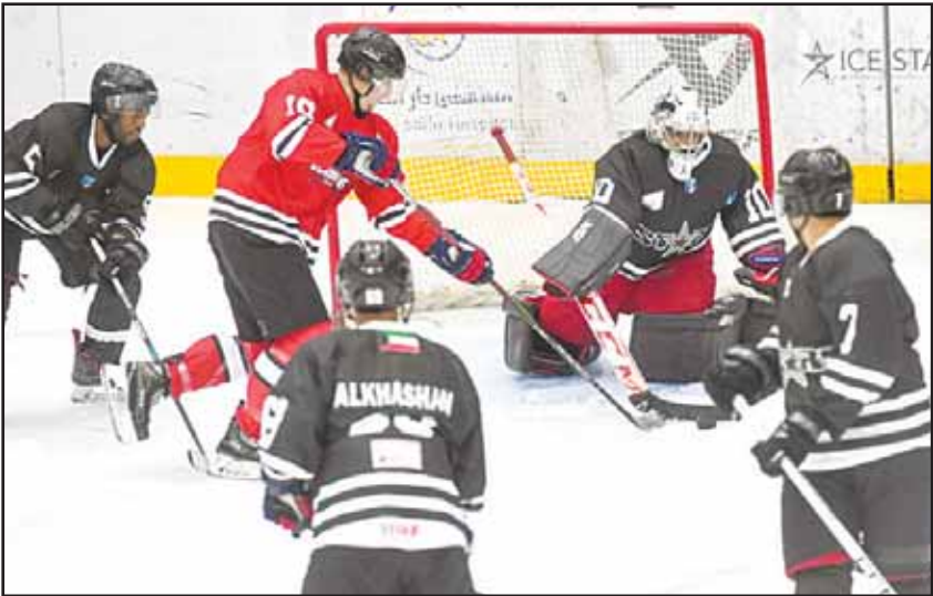
A hockey team presses forward while the opponents scramble to defend.

KUWAIT CITY, Sept 17, (KUNA): The 2025–2026 season of the Kuwait Men’s Ice Hockey League got underway, featuring five teams. The tournament is organized by the Kuwait Winter Games Club and is being held at the club’s rink in Bayan, running through March next year.