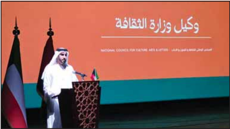
UAE Deputy Minister of Culture Mubarak Al-Nakhi speaks during the Kuwaiti Cultural Days in UAE launch.

ABU DHABI, Sept 17, (KUNA): The Kuwaiti National Council for Culture, Arts and Letters (NCCAL), in collaboration with the Ministry of Culture of the United Arab Emirates (UAE), inaugurated on Tuesday the Kuwaiti Cultural Days in the UAE as part of Kuwait's celebration of its designation as the Capital of Arab Culture and Media in 2025.