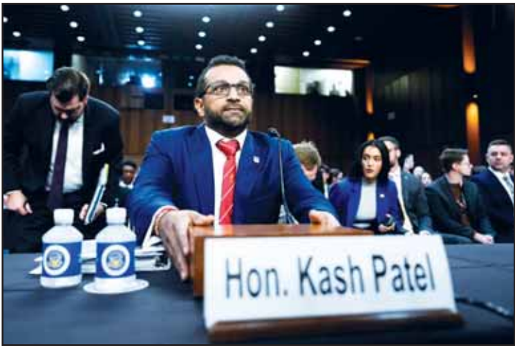
FBI Director Kash Patel appears before the Senate Judiciary Committee for his first oversight hearing on Sept 16, at the Capitol in Washington. (AP)