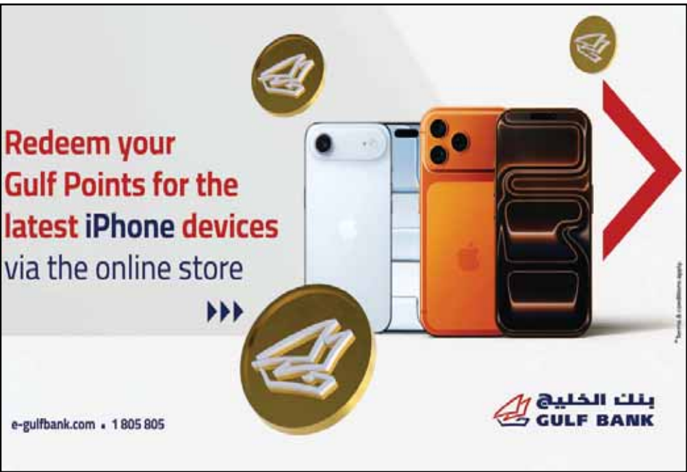
Gulf Bank eStore

Talking about the areas designated for the projects, Al-Mishari said Mutlaa City project covers an area of 2.12 million square meters, 1.02 million square meters in East Saad Al-Abdullah City, and 1.01 million square meters in West Saad Al-Abdullah City and Jaber Al-Ahmad City.