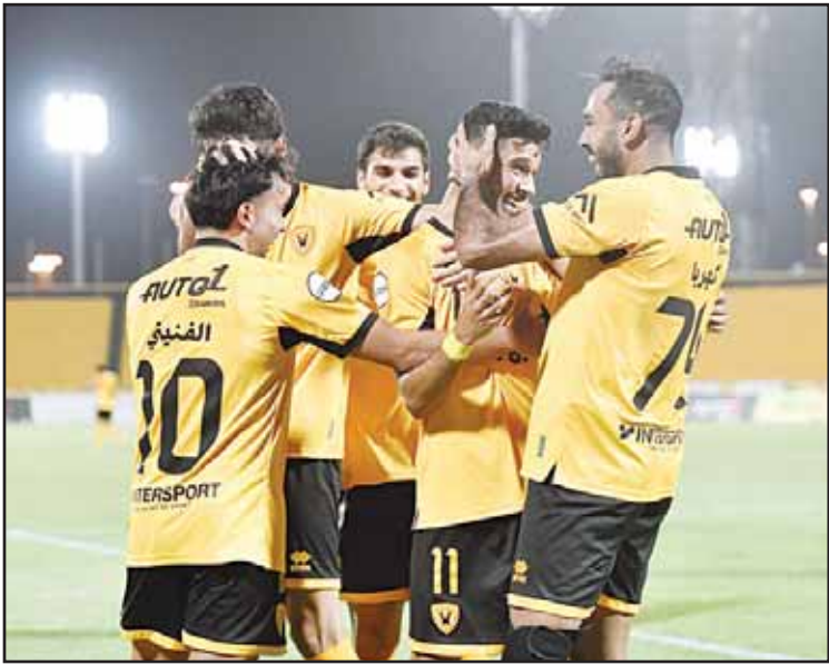
Qadsia players rejoice after finding the net.