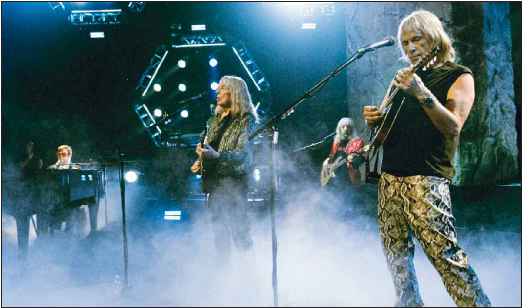
This image released by Bleecker Street shows, (from left), Elton John, Christopher Guest, Harry Shearer, and Michael McKean in a scene from 'Spinal Tap II: The End Continues.'