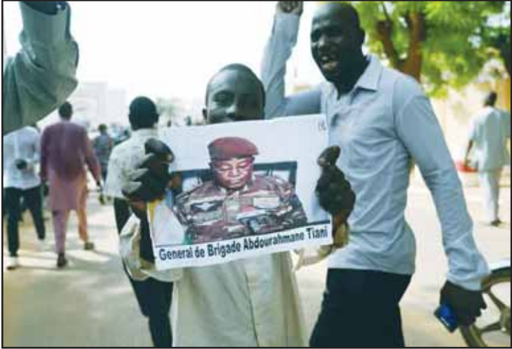
Nigeriens participate in a march called by supporters of coup leader Gen. Abdourahmane Tchiani, pictured, in Niamey, Niger on July 30, 2023. (AP)

NIAMEY, Niger, Sept 14, (AP): An ambush by armed men in a flashpoint region in military-run Niger last week killed at least 14 soldiers, the country's defense minister said in a statement, the latest in escalating militant attacks in the West African nation. The attack took place in the hotspot Tillabéri region on Wednesday, said the statement, broadcast by the state RTN television late Saturday. It followed the deployment of a military unit on the outskirts of Tillabéri, based on intelligence reports of an ongoing robbery there by a gang of armed men riding on motorcycles. "This attempted theft turned out to be a decoy intended to lure the patrol into an ambush," said Salifou Mody, the defense minister. He did not name the group suspected in the attack. Several militant groups that target both civilians and the military operate in Niger, including an Islamic State group affiliate. The Tillabéri region borders borders Mali and Burkina Faso - two other countries struggling with escalating insurgency - and has been a hotspot for terror attacks over the past decade. The Nigerien military government came to power in 2023, after deposing the country's democratically elected