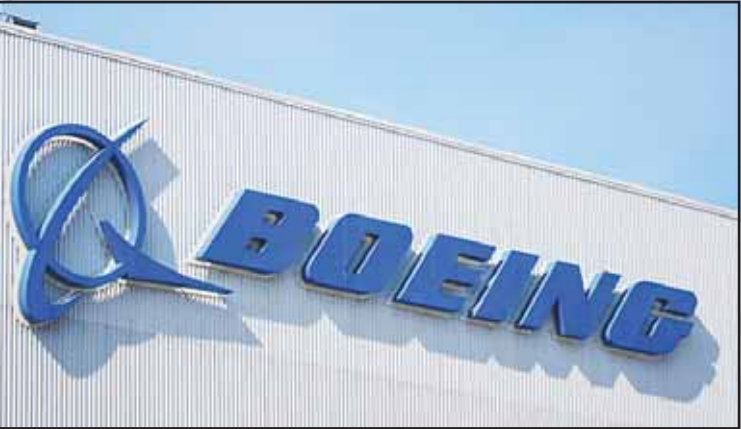
The Boeing logo is displayed at the company's factory, Sept. 24, 2024, in Renton, Wash.

Among other violations, the regulator also found that a Boeing employee pressured a member of Boeing's ODA unit, which is tasked with performing certain inspections and certifications on the FAA's behalf, to sign off on a 737 Max airplane