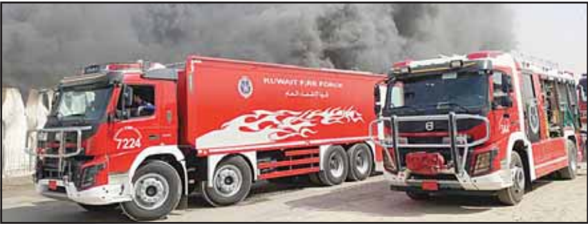
Firefighters extinguish fire in warehouses holding flammable materials.