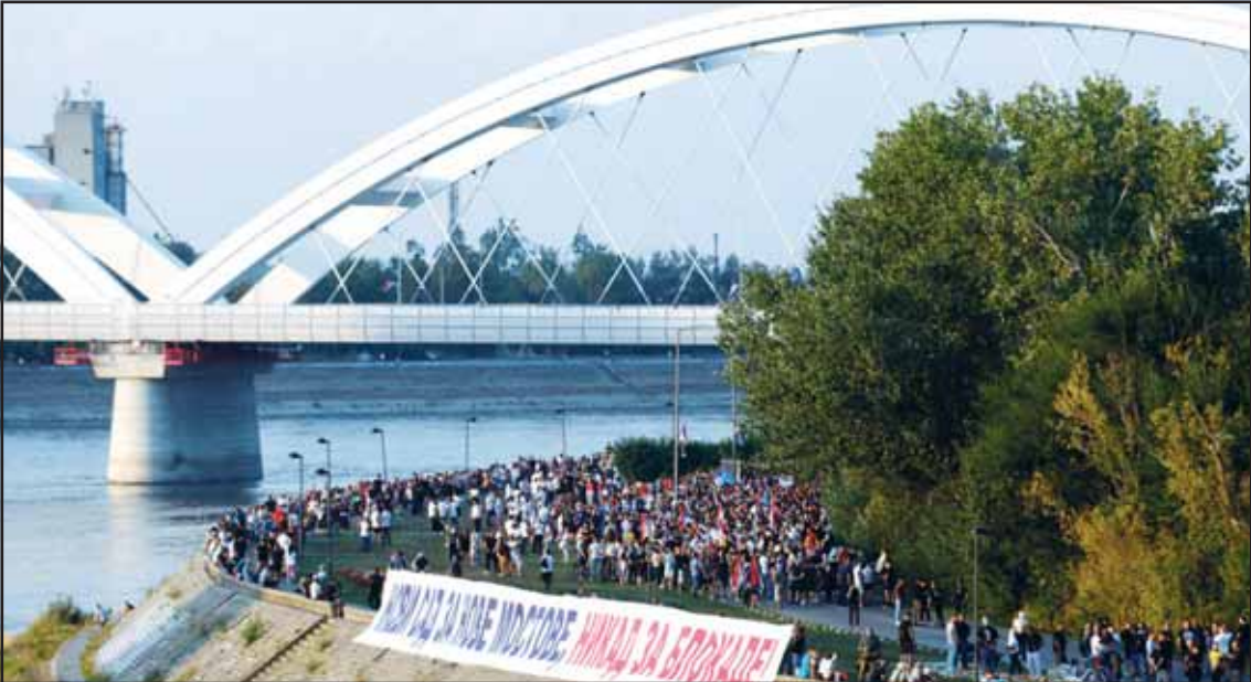
Supporters of Serbian President Aleksandar Vucic attend a 'Family gatherings against blockades' rally in Novi Sad, Serbia on Sept 13.