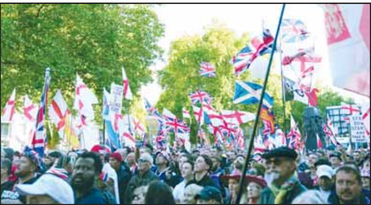
People demonstrate during the Tommy Robinson-led Unite the Kingdom march and rally, in London on Sept 13.

"There is no doubt that many came to exercise their lawful right to protest, but there were many who came intent