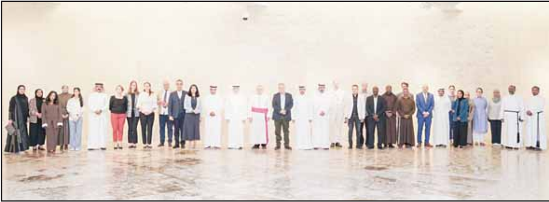
Symposium participants pose for a group photo.