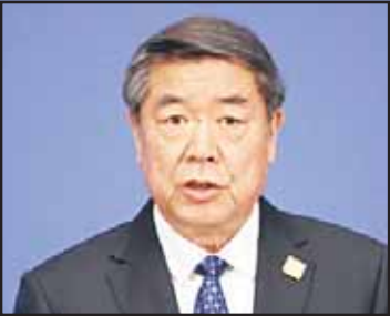
Chinese Vice Premier He Lifeng speaks during a press conference after the 11th China-UK Economic and Financial Dialogue in Beijing, on Jan 11, 2025.

The meetings between Bessent and He in Madrid will be the latest in a series of negotiations aimed at reducing trade tensions and postponing the