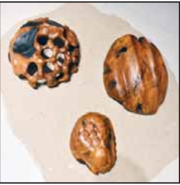
Wooden sculptures displayed