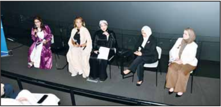
Cultural and arts dialogue sessions