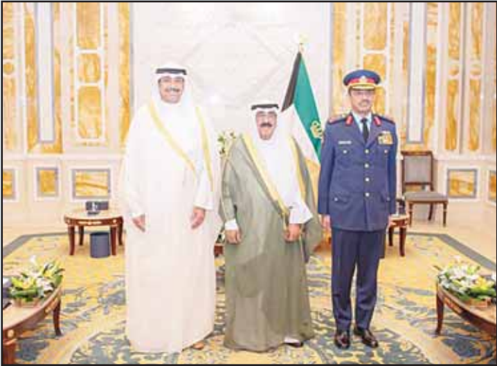
His Highness the Amir Sheikh Meshal Al-Ahmad Al-Jaber Al-Sabah receiving the Minister of Defense Sheikh Abdullah Ali Abdullah Al-Salem Al-Sabah and the Chief of Staff of the Army Lieutenant General Khaled Daraj Saad Al-Shuriaan.