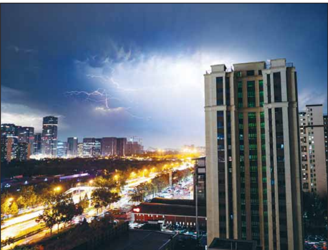
This stack composite photo taken on Sept 13, 2025 shows lightning in Beijing, capital of China. Scattered thundershowers hit Beijing on Saturday evening, accompanied by strong winds, hail, and short-lived downpours in some parts of the city.

abide by the one-China principle, support the Chinese people in opposing the "Taiwan independence" activities and consolidate the political foundation of bilateral relations. China is willing to enhance exchanges at all levels with Slovenia, expand cooperation in new fields such as high-end manufacturing, scientific and technological innovation, health and medicine, green energy and artificial intelligence, and provide a fair, open, and non-discriminatory business environment for enterprises of the two countries, Wang said. Both sides should leverage their respective strengths, promote trade balance in an open spirit, and jointly support economic globalization, he noted. Wang called on Slovenia to play an active role in promoting the healthy and stable development of relations between China and the European Union (EU). Chinese President Xi Jinping has proposed the Global Governance Initiative, which upholds five key principles that align with the shared aspiration of the international community, Wang said.