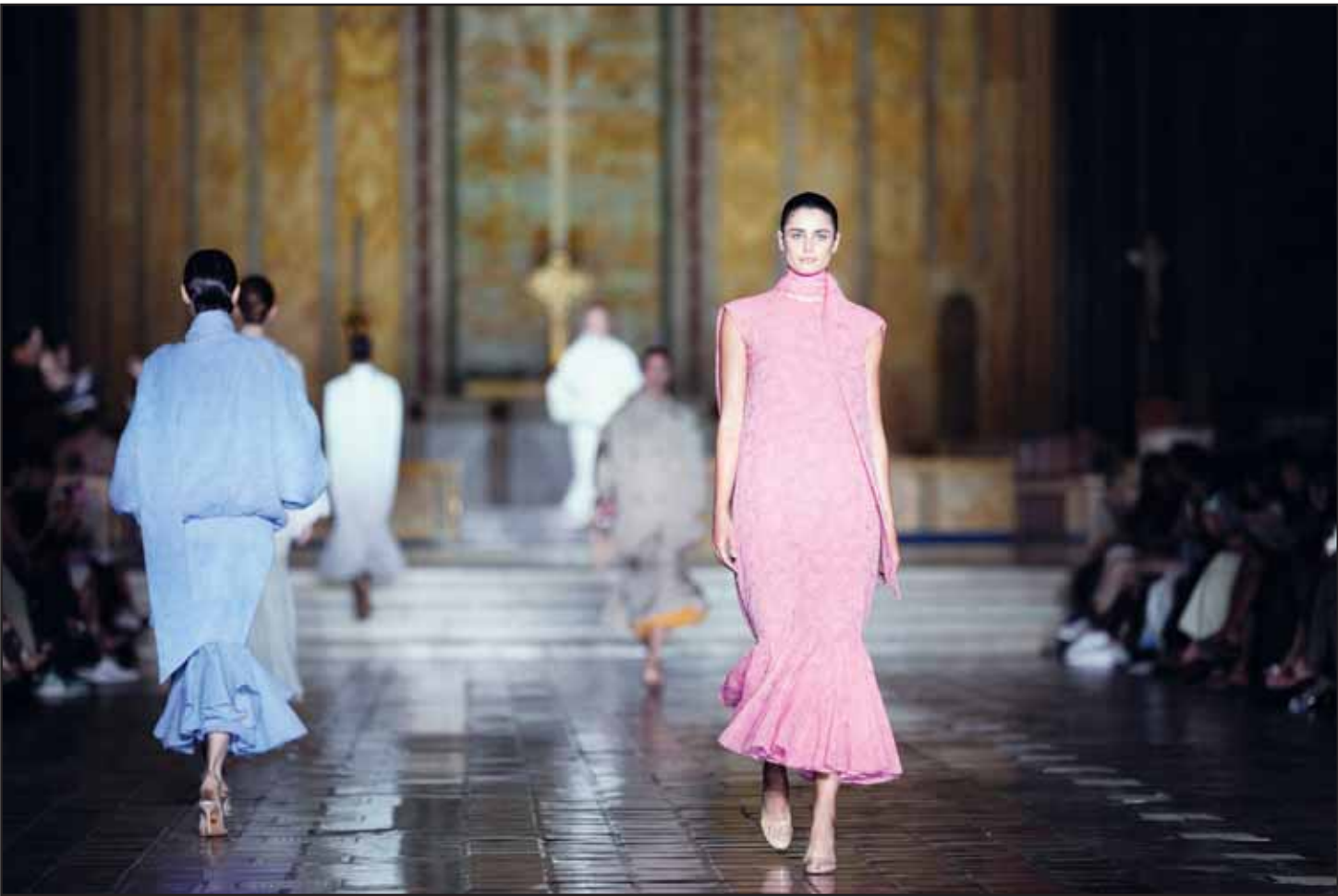
Models walk the runway during the Prabal Gurung Spring/Summer 2026 fashion show as part of New York Fashion Week at St. Bartholomew’s Church on Saturday, Sept. 13, in New York.