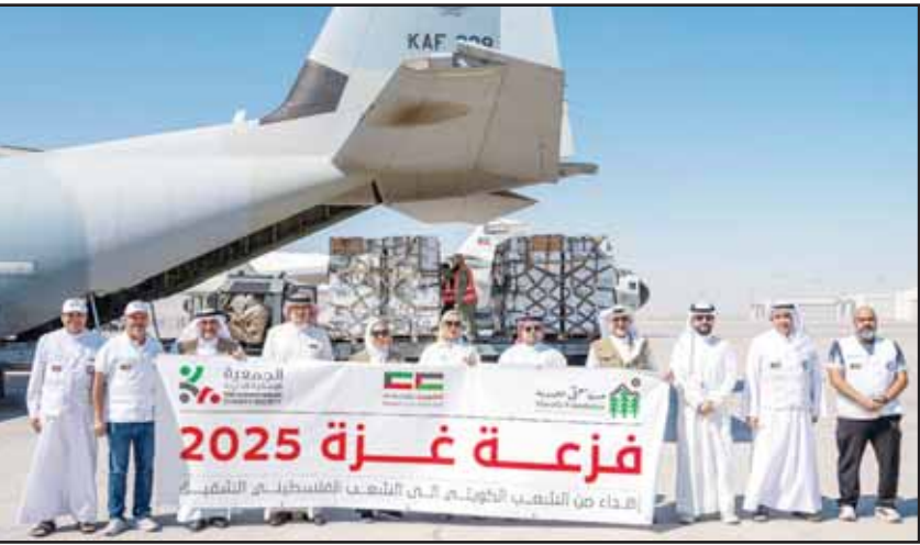
Official bodies participating in the eighth relief plane within the second airlift to provide relief to the Gaza Strip.

Dr. Al-Fajjam highlighted the vital role of faculty and training staff in instilling values, reinforcing ethics, and developing skills and knowledge. He affirmed that PAAET is actively proceeding with its plans to develop applied education and technical training in line with Kuwait’s vision to build a knowledge-based economy.