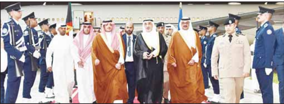
The First Deputy Prime Minister and Minister of Interior receives the Saudi Minister of Interior on the occasion of his official visit to the country.