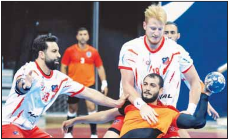
Kuwait Club players defend against Kazma player during the Arab Club Handball Championship match in Kuwait.