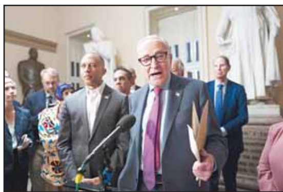
Senate Minority Leader Chuck Schumer, D-N.Y., joined at left by House Minority Leader Hakeem Jeffries, D-N.Y., speaks to reporters after meeting about Republican efforts to cut health care spending, at the Capitol in Washington, Thursday, Sept. 11.

Enrollment in ACA plans has surged to a record 24 million people in large part due to the billions of dollars in subsidies that have lowered costs for many people. The expanded subsidies allowed some lower income enrollees to access health plans with no premiums and capped the amount higher earners pay for premiums to 8.5% of their income. It also