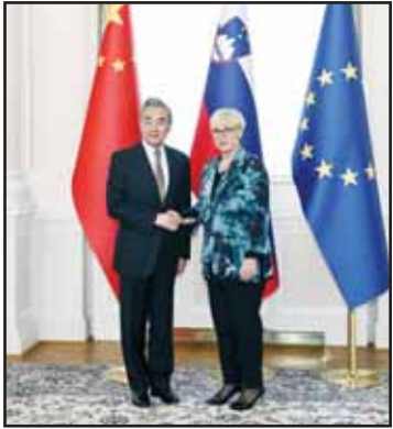
Slovenian President Nataša Pirc Musar meets with Chinese Foreign Minister Wang Yi, also a member of the Political Bureau of the Communist Party of China Central Committee, in Ljubljana, Slovenia on Sept 13. (Xinhua)

LJUBLJANA, Sept 14, (Xinhua): Top Chinese and Slovenian diplomats have pledged to strengthen political ties and enhance economic cooperation during their talks here on Saturday. During the talks with his Slovenian counterpart Tanja Fajon, Chinese Foreign Minister Wang Yi hailed the traditional friendship between the two countries, as China was one of the first countries to recognize Slovenia's independence more than 30 years ago. Wang, also a member of the Political Bureau of the Communist Party of China Central Committee, said that the bilateral relationship, featuring equality, sincerity, trust and win-win despite their social and institutional differences, is particularly valuable amid the current complex and turbulent international landscape. He called on the two countries to uphold the original aspiration, enhance communication, deepen mutual trust, bolster cooperation and continuously enrich the strategic connotation of the China-Slovenia partnership. The "Taiwan independence" separatist forces are seeking to promote sepa-