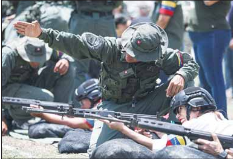
Members of the government-organized militias receive military training at Fort Tiuna in Caracas, Venezuela on Sept 13. (AP)

CARACAS, Venezuela, Sept 14, (AP): Personnel from a US warship boarded a Venezuelan tuna boat with nine fishermen while it was sailing in Venezuelan waters, Venezuela's foreign minister said on Saturday, underlining strained relations with the United States. The White House did not immediately respond to a request for comment. Tensions between the two nations escalated after US President Donald Trump in August ordered the deployment of warships in the Caribbean, off the coast of the South American country, citing the fight against Latin American drug cartels. While reading a statement on Saturday, Foreign Minister Yván Gil told journalists the Venezuelan tuna boat was "illegally and hostilely boarded by a United States Navy destroyer" and 18 armed personnel who remained on the vessel for eight hours, preventing communication and the fishermen's normal activities. They were then released under escort by the Venezuelan navy. The fishing boat had authorization from the Ministry of Fisheries to carry out its work, Gil said at a press conference, during which he presented photos of the incident. Along with the statement, Venezuela's foreign affairs ministry distributed a short video, taken, according to the ministry, by the Venezuelan fisher-