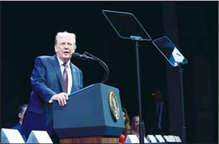
US President Donald Trump speaks to the White House Religious Liberty Commission during an event at the Museum of the Bible on Sept 8, in Washington.

"I'm doing everything I can about it," he said.