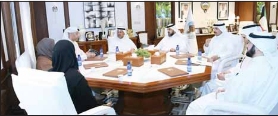
Farwaniya governor reviews new academic year preparations with education officials.

ideas and solutions. “Bring up inspiring topics, such as success stories or creative ideas, to enhance the value of the session. “We must avoid topics that provoke disagreement or, at the very least, agree to respect differences and avoid fanaticism. “We must enhance it with positive humor: laughter and humor are among the most beautiful components of diwanias, but humor must be free of sarcasm or insults. “Active listening makes everyone feel important, which strengthens bonds among attendees and makes the diwaniya a warm place. “Honesty, respect and avoiding backbiting help maintain the purity of the diwaniya. ‘Majlises’ are considered a mirror that reflects the character of participants. “If they are filled with positivity and respect, they will become a source of positive energy that nourishes souls and strengthens relationships. “If negativity prevails, it becomes a burden on everyone. “Let us ensure that our diwanias are a haven of comfort and inspiration among their patrons, and that they are pioneers of goodness and positivity. In doing so, we preserve our social heritage and improve the quality of our daily lives.” — Compiled by Simi K. Kutty