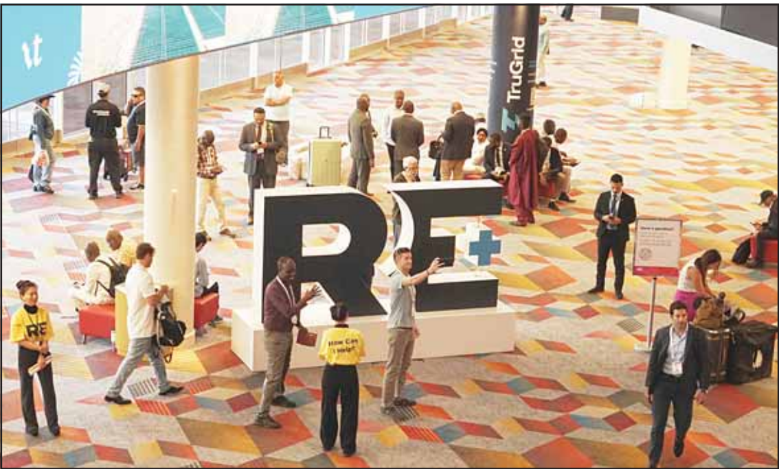
The RE+ expo, North America's largest clean energy gathering, kicked off last Monday in Las Vegas, the U.S. state of Nevada, bringing together industry leaders and experts to chart the future of sustainable power. The expo showcases cutting-edge products, technologies and solutions across a wide range of clean energy sectors, including solar, wind, hydrogen, microgrids, energy storage, as well as electric vehicle charging and infrastructure. (Xinhua)

For Premier PV, an Arkansas-based solar solutions company, tariffs are complicating component sourcing.