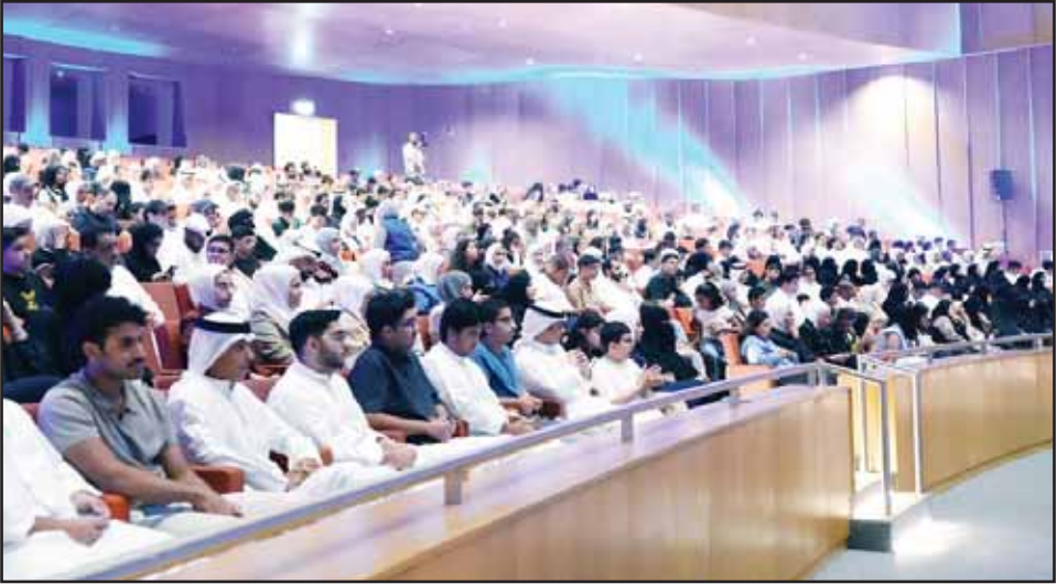
Part of the audience.

KFH’s commitment to advancing sustainable technological innovation and empowering youth to leverage their skills for the benefit of society and the environment.