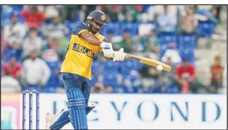
Sri Lanka's Kusal Perera bats during the Asia Cup cricket match between Bangladesh and Sri Lanka at Zayed Cricket Stadium in Abu Dhabi, United Arab Emirates. (AP)

ABU DHABI, United Arab Emirates, Sept 14, (AP): Pathum Nissanka became the quickest Sri Lankan batter to reach 2,000 T20 runs as the opener sprinted his team to a six-wicket win over Bangladesh in a crucial Asia Cup match.