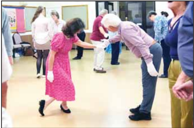
Members of the Hampshire Regency Dancers practice dance in Winchester, England, Sept. 10, ahead of the 10 days Jane Austen Festival starting on Friday. (AP)

GAZIANTEP, Türkiye: The seventh edition of the international gastronomy festival GastroAntep kicked off on Saturday in Gaziantep of southeastern Türkiye, a city renowned for its rich culinary heritage. Co-organized by the Gaziantep Metropolitan Municipality and Türkiye’s Ministry of Culture and Tourism, the nine-day festival, running from Sept. 13 to 21, features hundreds of events, including concerts, theater performances, talks, and gastronomic presentations. Deputy Minister of Culture and Tourism Nadir Alpaslan said at the opening ceremony. On Saturday, the festival kicked off with a lively procession winding through the heart of Gaziantep. Beginning at Gaziantep Castle, it passed the bustling, historic Coppersmiths’ Bazaar before concluding at Balikli Park, one of the city’s