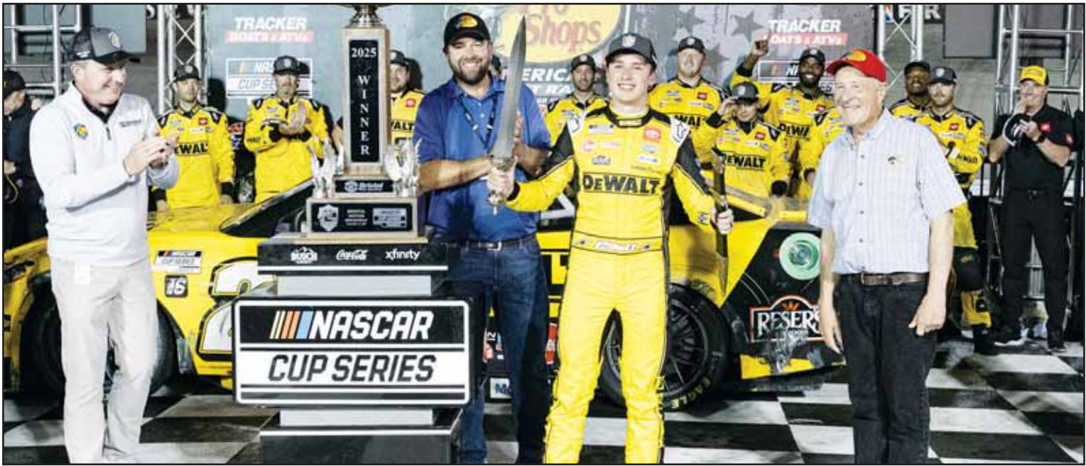
Christopher Bell celebrates winning a NASCAR Cup Series auto race in Bristol, Tenn.

Bell went from fourth to first on the final restart and led the last four laps at the 0.533-mile oval, ending a 24-race winless streak with his fourth victory of the season. “It wasn’t pretty there at the end, but we got her done,” said Bell, who led only 12 laps in his 13th career victory. “We just know that any given week, it could be us, and it hasn’t been for a long time. But Bristol, baby, tonight it’s us.” He joined JGR teammates Denny Hamlin and Chase Briscoe as playoff winners with the first round concluding at Bristol. Alex Bowman, Austin Dillon, Shane van Gisbergen, and Josh Berry were eliminated from the 10-race championship run. “Just so excited about the start to the playoffs,” team owner Joe Gibbs said. Bell finished 0.343 seconds ahead of Brad Keselowski, who was trying to end a 51-race winless streak. “Just the story of our season,” Keselowski said. “Just a 50-50 shot on the restart, and I got the lane that couldn’t