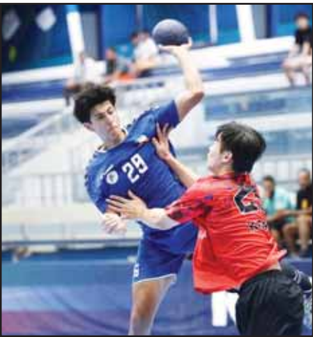
A Kuwaiti player tries to score as the opposition puts up a defense.