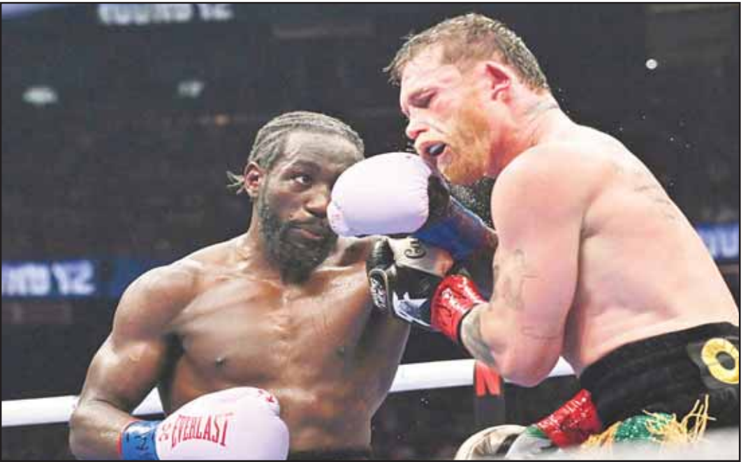
Terence Crawford, left, punches Canelo Alvarez during an undisputed super middleweight championship boxing match in Las Vegas.