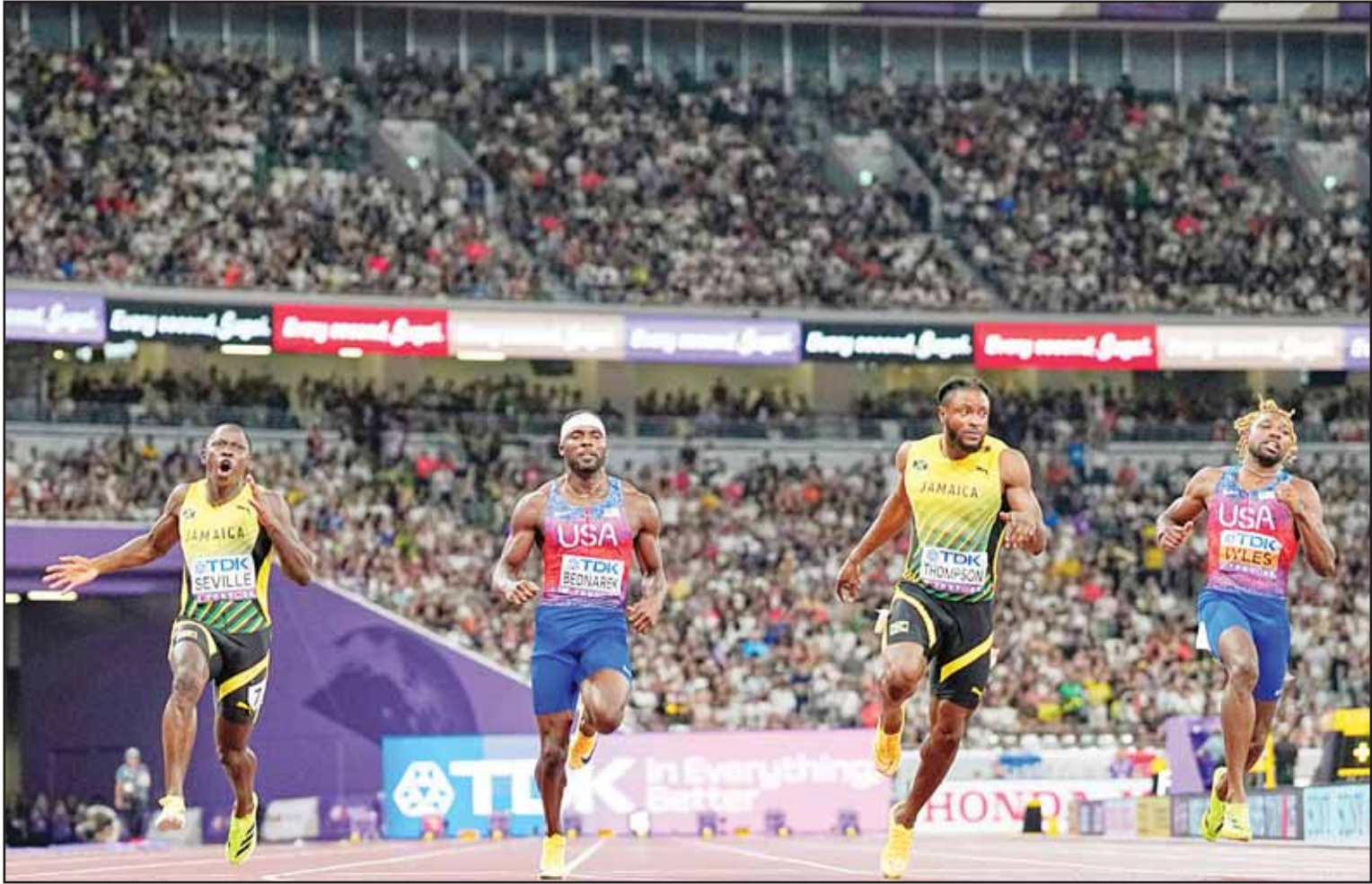
Jamaica's Oblique Seville, left, celebrates winning the gold medal in the men's 100 meters final ahead Jamaica's Kishane Thompson, United States' Noah Lyles and United States' Kenneth Bednarek at the World Athletics Championships in Tokyo.