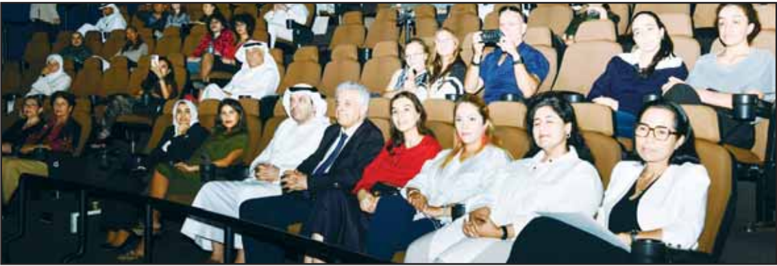
Audience attending the SDGs Through Arts event.

The university emphasized the importance of thorough preparation for the start of the first semester and a strong commitment to maintaining order and public safety on campus.