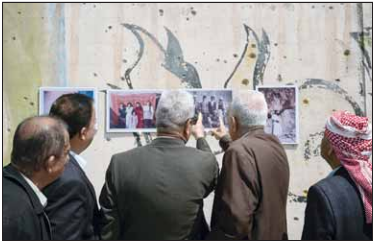
This photo provided by The Sersal Project shows an exhibition of community and archival photographs during Yazidi New Year celebrations in the town of Bashiqa, Iraq, in April 2025. killed thousands of Yazidis and sent thousands more into exile or sexual slavery. It also destroyed much of their built heritage and cultural history, and the small community has since become splintered around the world.