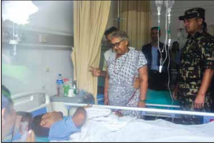
Nepal's interim prime minister Sushila Karki, center, speaks to a person who was injured during anti-corruption protests at Civil hospital in Kathmandu, Nepal on Sept 13. (AP)

KATHMANDU, Nepal, Sept 14, (AP): Nepal's new prime minister took office Sunday and "urged calm and cooperation to rebuild" the Himalayan nation after days of violent protests last week left at least 72 people dead and destroyed government buildings and politicians' homes. Sushila Karki, the country's first woman prime minister, told top officials gathered at her temporary office that each family of slain protesters will receive monetary compensation of 1 million rupees (about $ 11,330) and assured that those injured would be taken care of, state TV reported. "We all need to get together to rebuild the country," Karki said, pledging to work to get the South Asian nation back on track. The massive demonstrations - called the protest of Gen Z - began on Sept 8 over a short-lived social media ban. Tens of thousands of protesters took to the streets, particularly young people, angry about widespread corruption and poverty, while the children of political leaders, known as "nepo kids," seemed to enjoy luxurious lifestyles. The protests soon turned violent, with protesters attacking the parlia-