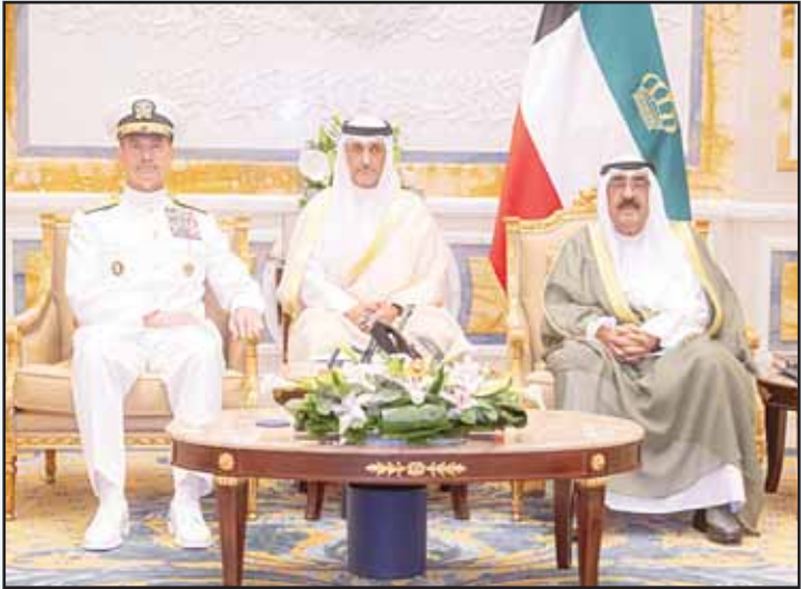
His Highness the Amir Sheikh Meshal Al-Ahmad Al-Jaber Al-Sabah receives Commander of the US Central Command, Admiral Brad Cooper.