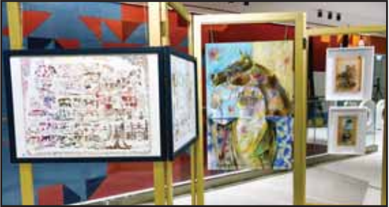
Art works of groups of international and local artists on display.