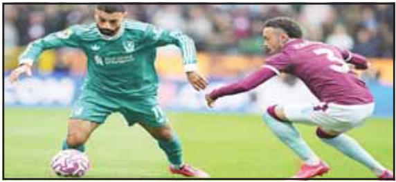
Burnley's Quilindschy Hartman guards Liverpool's Mohamed Salah during the Premier League soccer match between Burnley and Liverpool in Burnley, England.