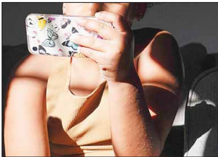
A girl uses her smartphone at home in Arizona on Friday, June 16, 2023.

"We have invested a tremendous amount of resources in Trust and Safe-