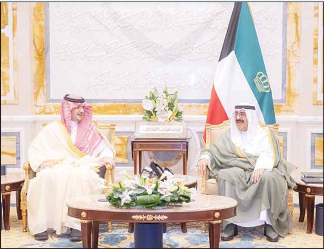
His Highness the Amir Sheikh Meshal Al-Ahmad Al-Jaber Al-Sabah receiving the Saudi Minister of Interior, His Royal Highness Prince Abdulaziz bin Saud bin Nayef bin Abdulaziz Al Saud

Prince Abdulaziz conveyed to His Highness, the greetings and appreciation of King Salman bin Ab-