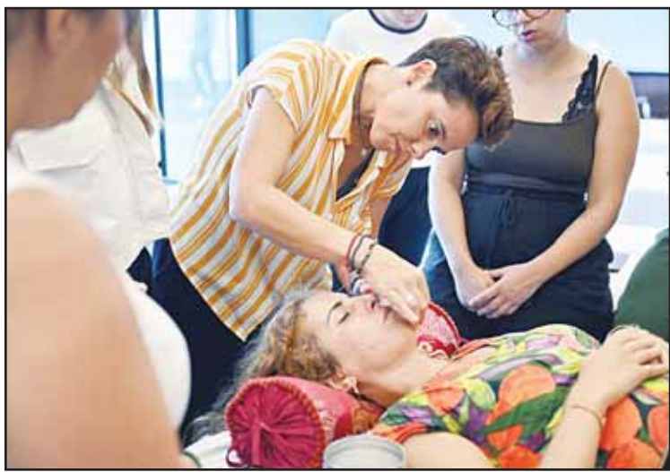
A foreign trainee takes hands-on acupuncture practice in Sanya, south China's Hainan Province, Aug. 7, 2025.

A third of those received up to 15 standard acupuncture treatments over three months, and another third received an additional six acupuncture treatments over the following three months. Patients provided self-assessment of their pain and physical limitations after three, six and 12 months from enrollment.