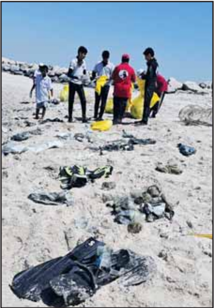
The Kuwait Dive Team removing plastic and iron debris from Khor Iskandar.

to remove boats and fishing nets from coral reefs, and will conduct awareness campaigns on the importance of preserving the marine environment through lectures and educational materials. He emphasized the need to adhere to the Environmental Protection Law to avoid environmental violations and preserve the marine environment, and urged beachgoers to protect sea turtles, as they are rare and endangered, and to refrain from throwing waste into the water. Since its founding in 1986, the Kuwait Dive Team has been performing these activities on a voluntary basis in service to Kuwait and its people, and to preserve the marine environment and ensure safe navigation.