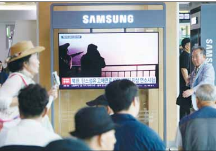
A TV screen shows an image of North Korean leader Kim Jong Un, (second from left), supervising a test of a new rocket engine during a news program at the Seoul Railway Station in Seoul, South Korea on Sept 9.

Weapons Institute and the Tank Designing Bureau, said the report, adding that he was also briefed in detail on research in the field of armored defense, including the development of special composite armor. He said the combat capability of the DPRK's armored forces has been remarkably bolstered with the successful development and deployment of the directional infrared and jamming equipment, as well as active and passive protection systems. Kim also visited the Electronic Weapons Institute, where he learned about and