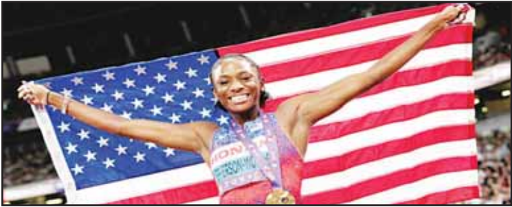
United States' Melissa Jefferson-Wooden poses after winning the gold medal in the women's 100 meters final at the World Athletics Championships in Tokyo.