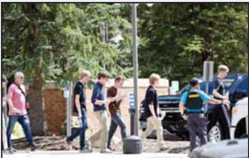
Students walk to board a bus amid heavy police presence at the Evergreen Library after a shooting at Evergreen High School in Evergreen, Colo on Sept 10.

"As you can imagine, this was a very chaotic scene.