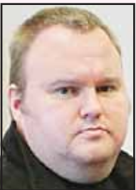
(Pic X) Dotcom

The Megaupload founder had applied for what in New Zealand is called a judicial review, in which a judge is asked to evaluate whether an official's decision was lawful.