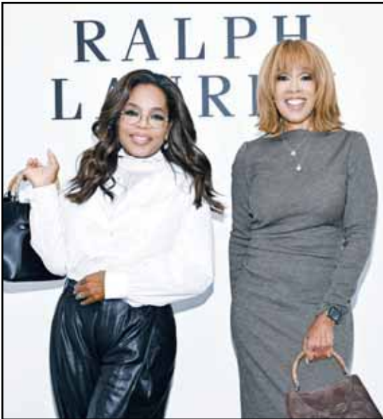
Oprah Winfrey, (left), and Gayle King attend the Ralph Lauren Spring 2026 fashion show.