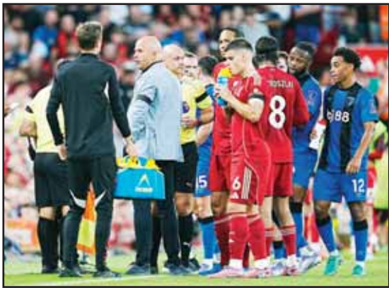
In this file photo, referee Anthony Taylor during a stop in play after Bournemouth's Antoine Semenyo, second right, informs the referee of a possible racial comment from the crowd during the English Premier League soccer match between Liverpool and Bournemouth at Anfield, Liverpool, England.

Soccer's tribal culture and frenzied fan base makes it a prime stage for societal problems like racism to surface. English soccer had a particularly harrowing time with racism in the 1970s and '80s when Black players were regularly subjected to monkey chants and offensive slurs.