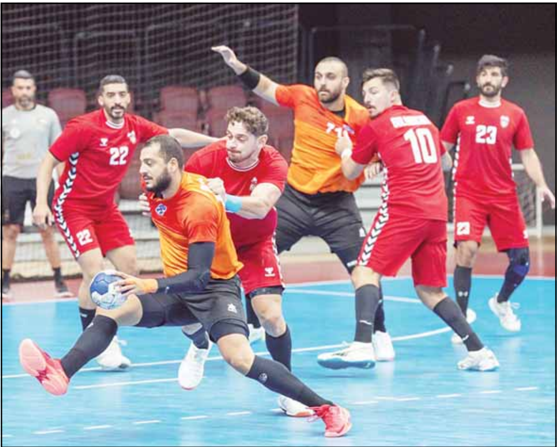
Players preparing for the championship in Kuwait.