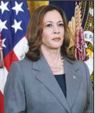
The then Vice President Kamala Harris listens during an event with President Joe Biden in the East Room of the White House in Washington, Sept. 26, 2024.

“On his worst day, he was more deeply knowledgeable, more capable of exercising judgment, and far more compassionate than Donald Trump on his best. But at 81, Joe got tired. That’s when his