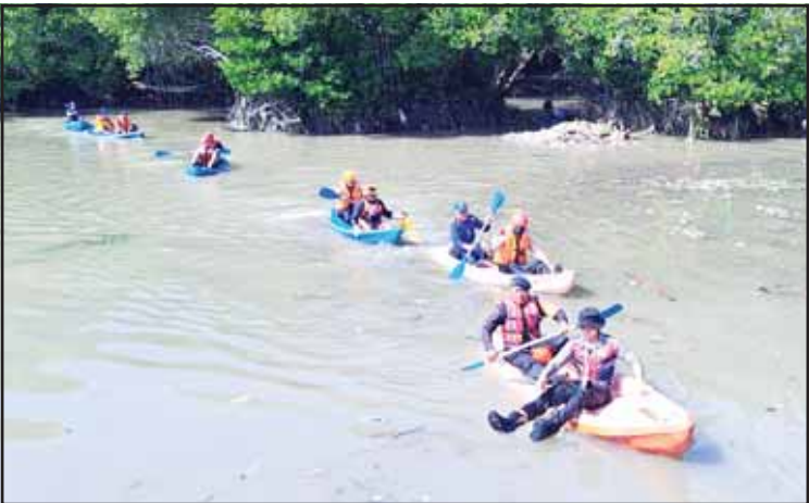
In this photo released by Indonesia's National Search and Rescue Agency (BASARNAS), rescuers search for victims of flash flood in Bali, Indonesia, on Sept 11.

Suharyanto, the head of the National Disaster Mitigation Agency, told a news conference late Wednesday that the threat of flooding in Bali is