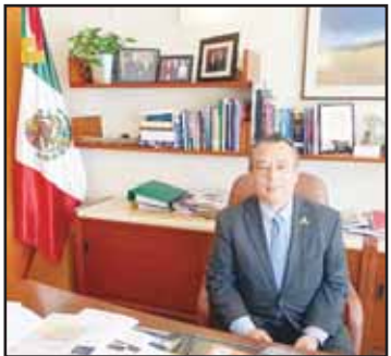
H.E. Eduardo Patricio Peña Haller, Ambassador of Mexico to the State of Kuwait

The National Holiday of Mexico is celebrated on September 16 in all parts of the world where Mexican citizens reside. In Mexico the full month of September is considered the month of "La Patria" (motherland). Therefore on the night of September 15 the so-called "Cry of Independence" takes place, which commemorates the beginning of the armed struggle in 1810, led by priest Miguel Hidalgo y Costilla that allowed Mexico to become an independent country. It is therefore very usual for every Mexican household to