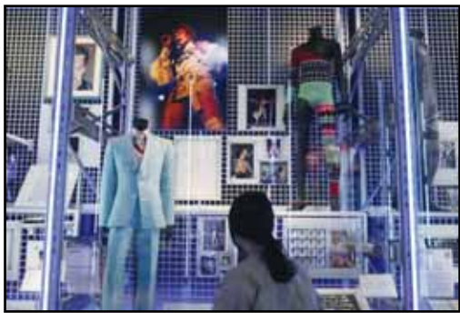
A general view of the David Bowie Centre, a new archive at the V&A East Storehouse in London, Wednesday, Sept. 10, ahead of its public opening on Saturday.