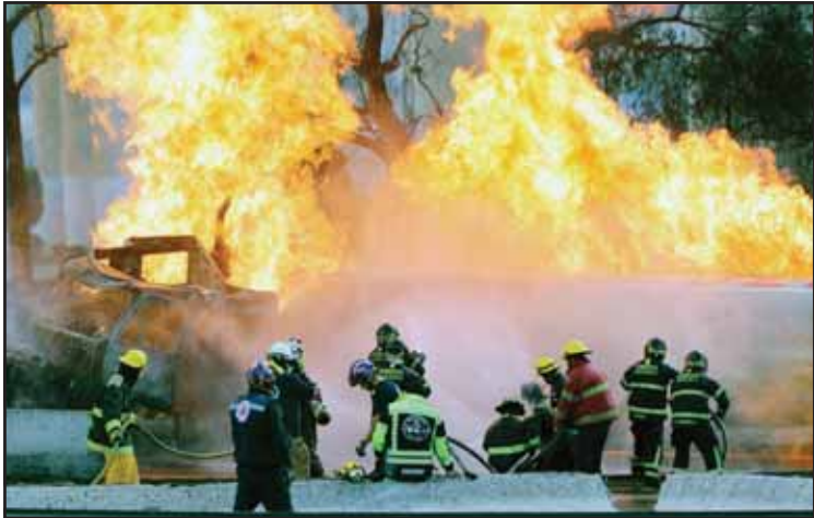
Firefighters spray hoses at a gas tanker that exploded under a highway overpass in Mexico City on Sept 10. (AP)

MEXICO CITY, Sept 11, (AP): Mexican investigators were working to determine the cause of a crash in which a tanker truck carrying more than 13,000 gallons (49,500 liters) of gas exploded on a major highway in the capital, killing at least four people and injuring 90. The fiery crash Wednesday that burned more than two-dozen vehicles created a gruesome scene of badly burned survivors staggering in the street in tattered clothing as first responders rushed to the scene. The injured suffered second- and third-degree burns. The tragedy drew renewed attention to the thousands of trucks that rumble through Mexico daily carrying liquid propane, which most homes and businesses rely on for cooking and heating water. Regulators said a preliminary review revealed the truck did not have up-to-date insurance allowing it to transport gas. While Wednesday's accident involved a large tanker, rather than the smaller ones that make residential deliveries, both have been involved in deadly crashes over the past decade. In 2020, a double tanker carrying liquid propane flipped on a highway in the western state of Nayarit and killed 13 people when the fire spread to other vehicles.