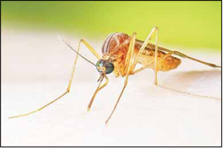
In this photo provided by the US Centers for Disease Control and Prevention, a female Culex quinquefasciatus mosquito, also known as the southern house mosquito, sits on a person’s skin before taking a blood meal in 2022.

that might have supported life way back when. When Perseverance launched in 2020, NASA expected the samples back on Earth by the early 2030s. But that date slipped into the 2040s as costs swelled to $11 billion, stalling the retrieval effort. Until the samples are transported off of Mars by robotic spacecraft or astronauts, scientists will have to rely on Earthly stand-ins and lab experiments to evaluate the feasibility of ancient Martian life, according to Hurowitz. NASA’s acting Administrator Sean Duffy said budgets and timing will dictate how best to proceed, and even raised the possibility of sending sophisticated equipment to Mars to analyze the samples on the red planet. “All options are on the table,” he said. Ten of the titanium sample tubes gathered by Perseverance were placed on the Martian surface a few years ago as a backup to the rest aboard the rover, all part of NASA’s still fuzzy return mission.