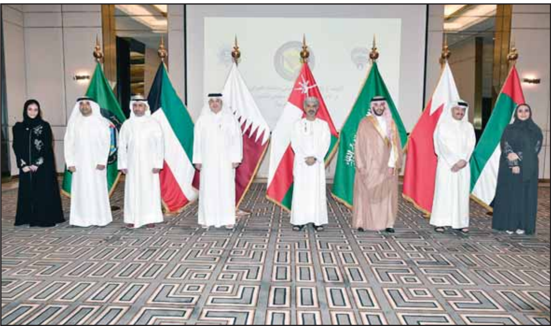
Group photo of officials of the port authorities and maritime administrations of the Gulf Cooperation Council (GCC).

He noted that discussions also addressed regulations for traditional commercial vessels entering GCC waters and ports, safety requirements for berths serving such vessels, and the implementation of an electronic ownership registration system for maritime units. Other agenda items included easing the use of maritime means for coastal travel, regulations for issuing marine driving licenses, and the establishment of specialized training centers to build national maritime capacities. Sheikh Mubarak emphasized the GCC's commitment to enhancing co-operation and advancing the maritime transport sector to boost its economic and social impact and support regional maritime trade. He added that with all GCC countries overlooking the Arabian Gulf, port authorities play key roles not only in regulating maritime movement but also in protecting the marine environment and ensuring the sustainability of