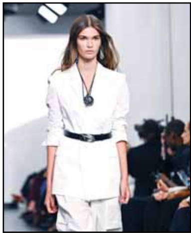
A model presents a look on the runway at Ralph Lauren Spring 2026 fashion show.