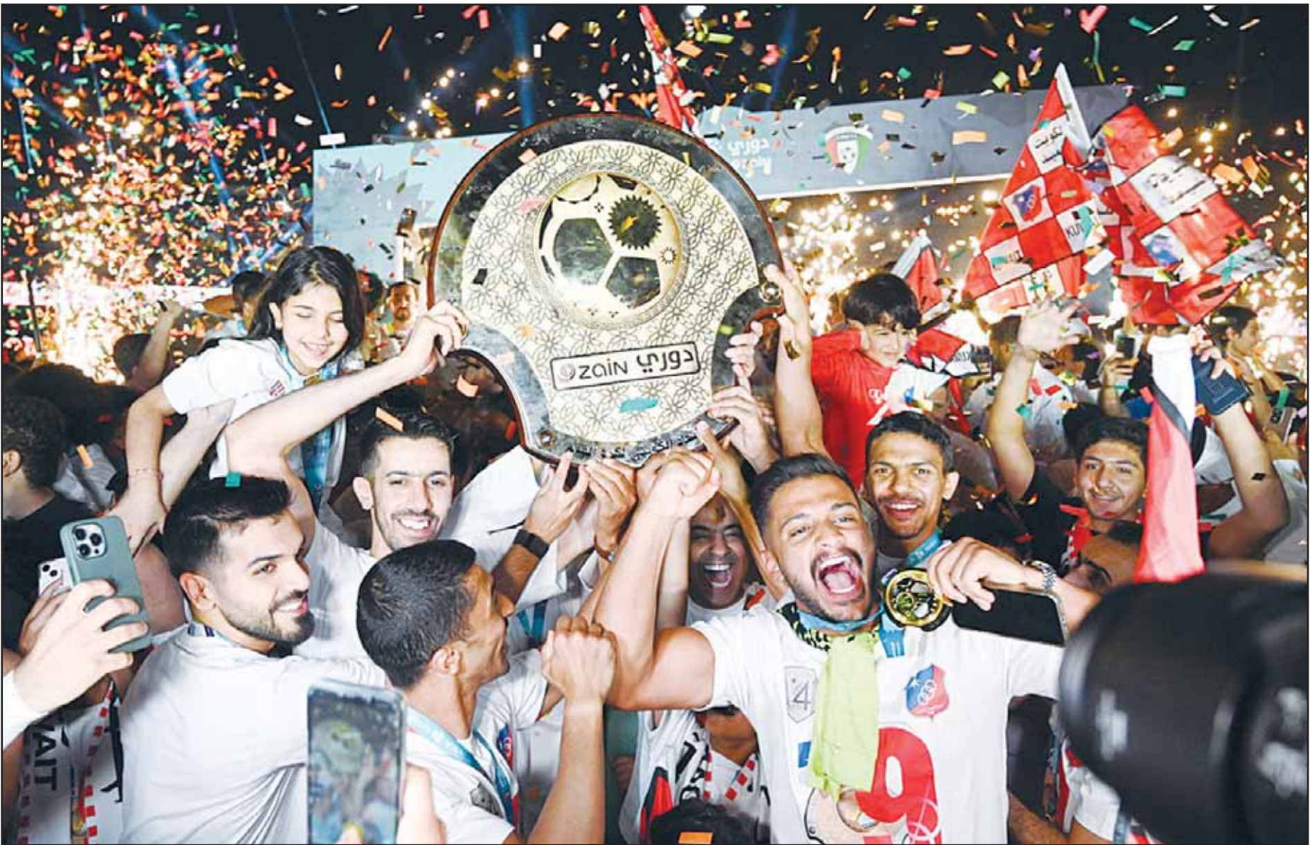
A file of Kuwait Club celebrating after winning Zain Premier League.

Kuwait Club remains the most successful team in league history, boasting 20 titles, including four consecutive wins over the past four seasons. Al-Arabi and Al-Qadsia follow with 17 titles each, while Al-Salmiya and Kazma have four each, and Al-Jahra has one. Kuwait Club is aiming for a historic fifth consecutive title, having previously achieved four straight wins twice: from 2016–2017 to 2019–2020 and from 2021–2022 to 2024–2025. Other top clubs, including Al-Qadsia, Al-Arabi, Kazma, and Al-Salmiya, are determined to challenge for the championship. Their goals include reclaiming long-lost titles, ending Kuwait Club's recent domestic dominance, and establishing themselves as strong contenders in the league.