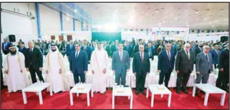
Photo during the inauguration.

ing joint workshops or exchanges with Indian institutions, and expanding technical and operational cooperation following a recent memorandum of understanding. For his part, the Indian ambassador expressed gratitude for the warm reception, emphasizing his country's commitment to strengthening coordination and cooperation, enhancing air service quality, expanding partnerships, and commending Kuwait's ongoing efforts to sustainably develop and advance its civil aviation sector.