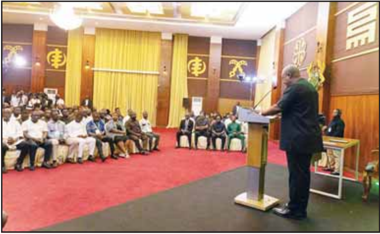
Ghana's President John Mahama speaks to the media at the Jubilee House in Accra, Ghana, Wednesday, Sept. 10, 2025.

ACCRA, Ghana, Sept 11, A group of 14 West Africans deported from the US arrived in Ghana, the country's president said. The country joins Eswatini, Rwanda and South Sudan as African countries that have received migrants from third countries who were deported from the US, a controversial approach whose legality lawyers for the deportees have questioned. "We agreed with (Washington) that West African nationals were acceptable because all our fellow West African nationals don't need a visa to come to our country," President John Mahama told reporters late Wednesday. The deportees had arrived in the country and included Nigerian and Gambian nationals who planned to return to their countries, he added. US President Donald Trump in his second term, has been aggressively cracking down on immigrants he says are criminals and from countries whose nationals have overstayed their visas in the US. However, there have been concerns about the conditions facing some deportees sent to Africa. Lawyers and activists have also questioned the legality of the deportations and argued that Trump's administration appears to be making such requests to the nations