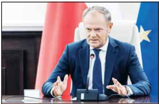
Polish Prime Minister Donald Tusk holds an extraordinary government meeting at the chancellery, with military and emergency services officials, following violations of Polish airspace during a Russian attack in Warsaw, Poland on Sept 10.

Underscoring the global repercussions of the war, China on Thursday urged Poland to keep open a section of the Belarus border for a China-EU freight track that crosses it. The rail line is part of China's Belt and Road Initiative to boost trade with other countries.