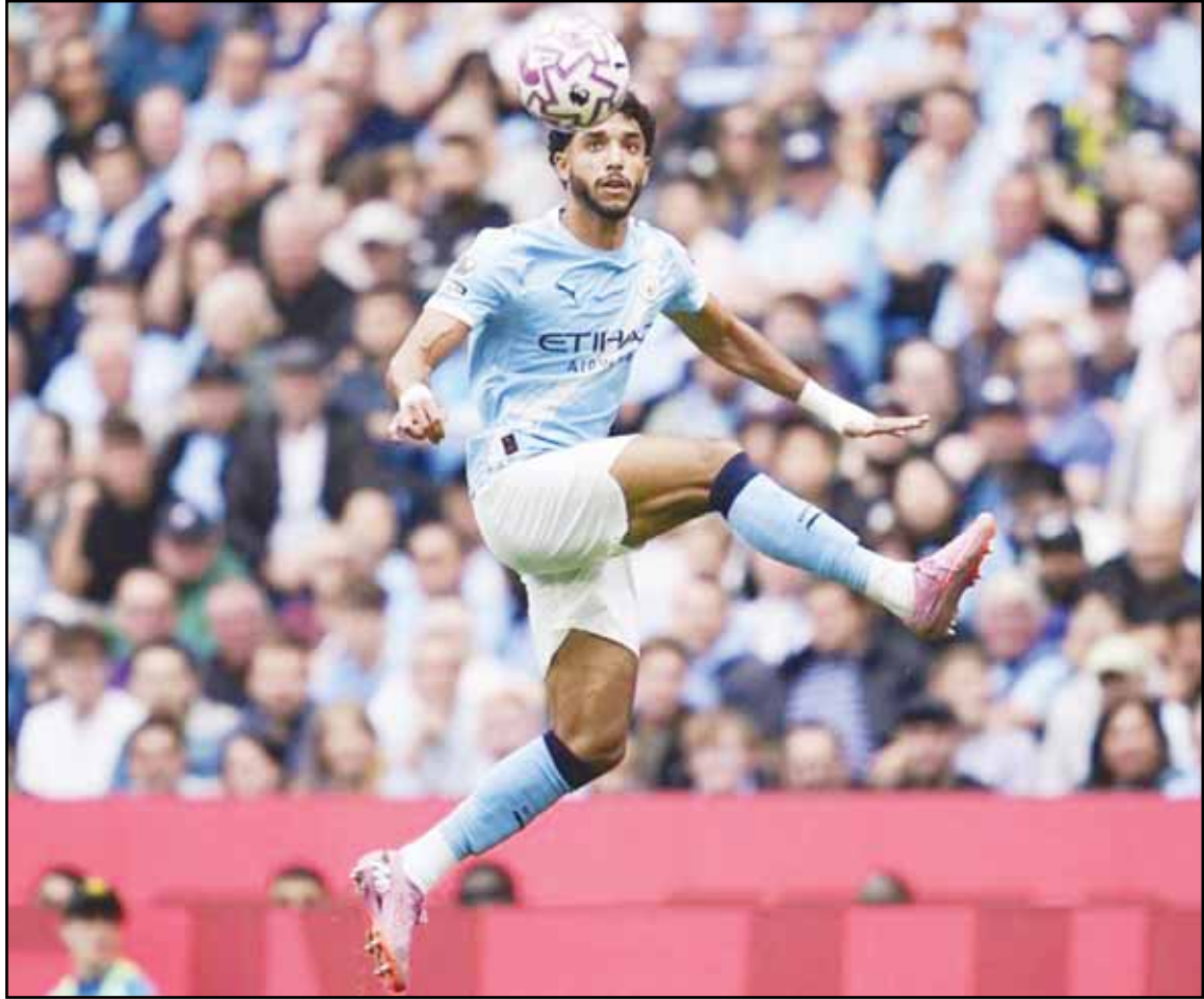
In this file photo, Manchester City's Omar Marmoush receives the ball during the Premier League soccer match between Manchester City and Tottenham in Manchester, England.

with Omar Marmoush injuring a knee on international duty with Egypt. Rayan Cherki will be out for around two months because of a torn left quadricep. New United signing Matheus Cunha hurt his hamstring against Burnley. Arsenal's injury list includes Bukayo Saka, William Saliba, and Kai Havertz. It's a new era at Tottenham. After nearly 25 years at the top, executive chairman Daniel Levy stood down last week, and Spurs said it was setting itself up to "deliv- er long-term sporting success." Fans called for Levy to go for years, even after last season's Europa League