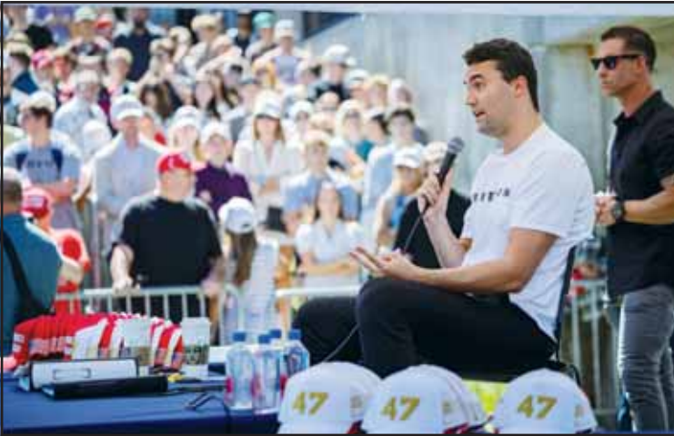
Charlie Kirk speaks before he is shot during Turning Point's visit to Utah Valley University in Orem, Utah on Sept 10.

"So much of the success we've had in this administration traces directly to Charlie's ability to organize and convene," Vance wrote. "He didn't just help us