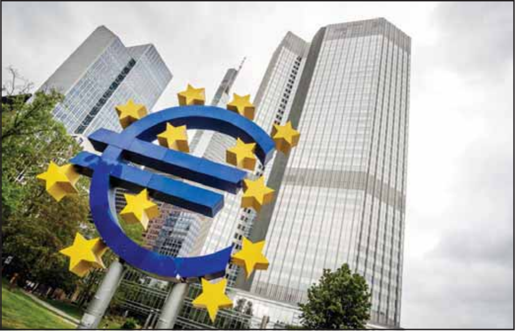
The Euro sculpture stands in front of the former headquarters of the European Central Bank (ECB) in Frankfurt, Germany, May 23, 2023.

The ECB's deposit rate influences borrowing costs throughout the economy. The ECB raised rates sharply to combat a burst of inflation in 2021-23, and has since lowered them as inflation came back under control and concerns grew about growth. Higher rates fight inflation but can slow growth, while lower rates can stimulate economic activity by making borrowing cheaper for purchases.