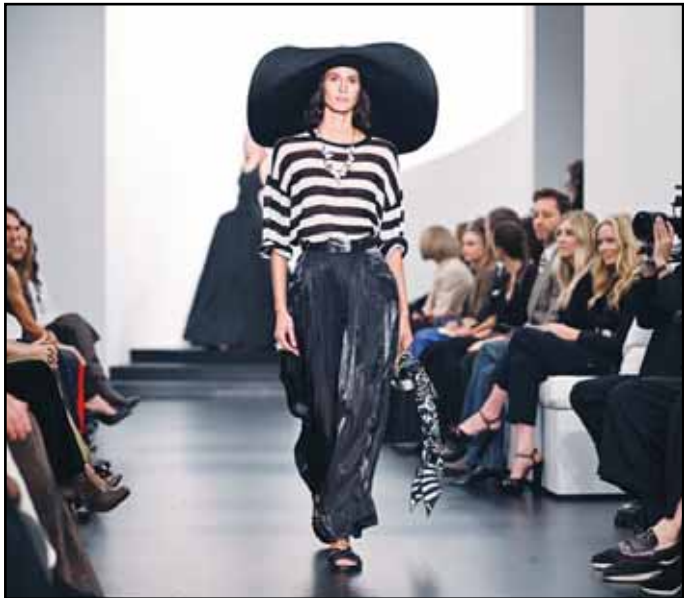
A model walks the runway during the Ralph Lauren Spring 2026 fashion show in New York.