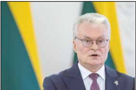
Lithuania's President Gitanas Nausėda speaks during a presser at the Presidential Palace in Vilnius, Lithuania on Sept 8.

Last month, US President Donald Trump spoke to Belarus' authoritarian president, Alexander Lukashenko, about the release of more prisoners.