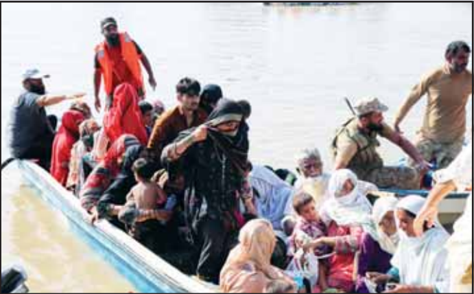
Villagers get off from a boat after being evacuated by rescue workers from a flooded area in Jalalpur Pirwala, in Multan district, Pakistan on Sept 10. (AP)

PESHAWAR, Pakistan, Sept 11, (AP): Pakistani security forces raided three militant hideouts in northwestern Pakistan, killing 19 fighters, the military said Thursday. The statement described the militants as "Khawarij," a term the government uses for the Pakistani Taliban. The group is allied with, but separate from, the Afghan Taliban, which seized power in Kabul in 2021. The military said fourteen militants were killed in an operation Wednesday in Mohmand district in Khyber Pakhtunkhwa province, near the Afghan border, and five others were killed in raids Thursday in the districts of North Waziristan and Bannu. The Pakistani Taliban, also known as Tehreek-e-Taliban Pakistan, attacked a security camp in Bannu last week, killing six soldiers. The raids came two days after Maj. Adnan Aslam died at a military hospital from wounds sustained in the Sept. 2 attack on a security camp in Bannu. A video circulating online showed Aslam shielding a wounded soldier during the assault before returning fire and killing an attacker, despite being critically wounded. Aslam has been hailed as a hero, and Prime Minister Shehbaz Sharif and army chief Field Marshal Asim Munir attended his funeral this week. Pakistan has witnessed a surge