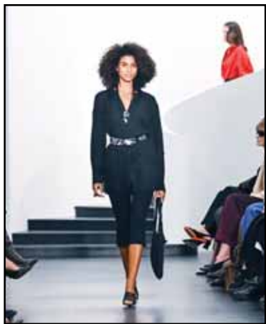
A model walks the runway during the Ralph Lauren Spring 2026 fashion show.