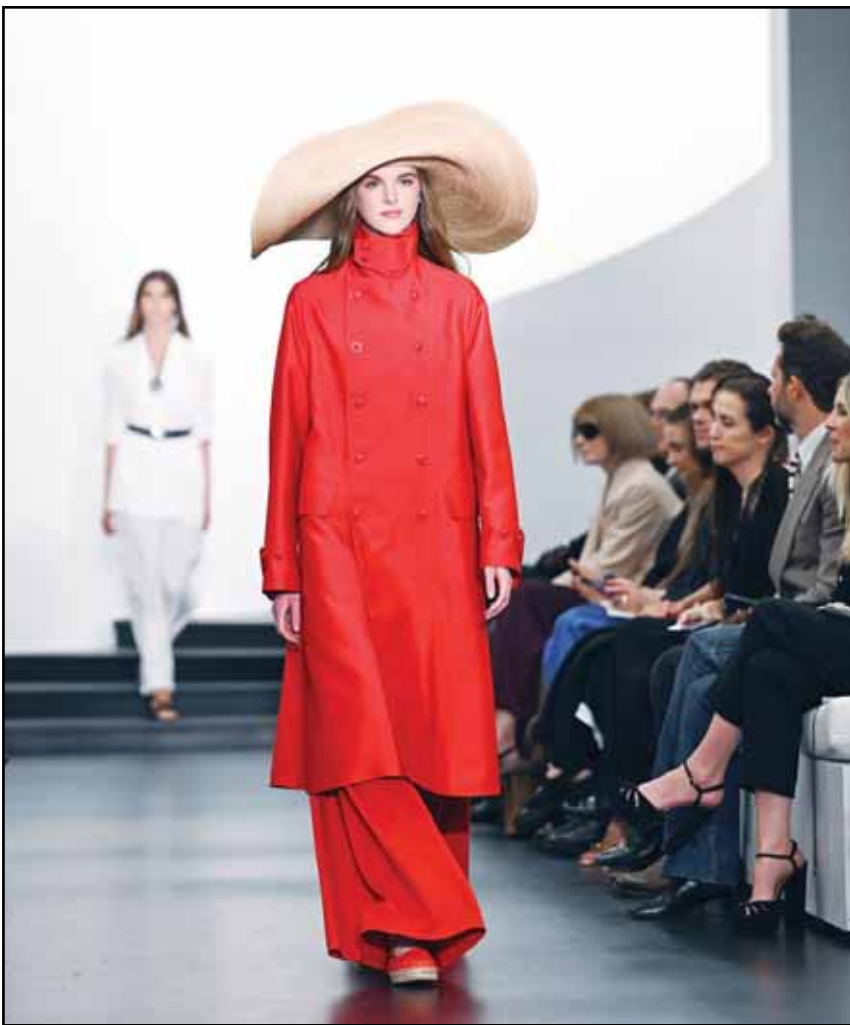
A model walks the runway during the Ralph Lauren Spring 2026 fashion show as part of New York Fashion Week on Wednesday, Sept. 10, in New York.