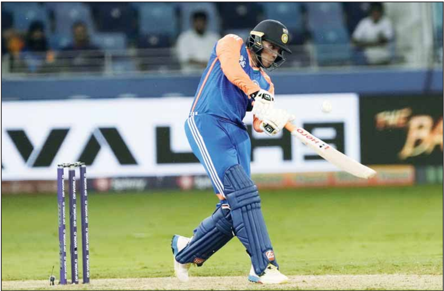
India's Abhishek Sharma plays a shot during the Asia Cup Cricket match between United Arab Emirates and India at Dubai International Cricket stadium in Dubai, United Arab Emirates.

Alishan Sharafu (22) and captain Muhammad Waseem (19) gave UAE a reasonable start of 41-2 in the powerplay before the batters crumbled against Kuldeep's sharp spin and Dube warmed up for more