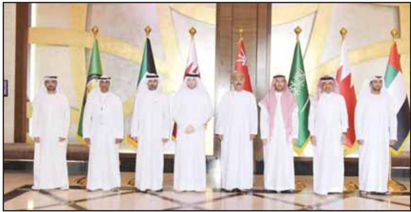
Representatives of interior ministries of the GCC states.