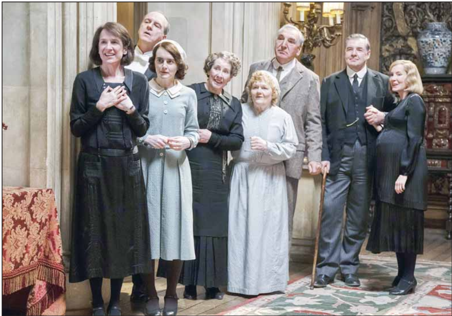
This image released by Focus Features shows Raquel Cassidy, from left, Kevin Doyle, Sophie McShera, Phyllis Logan, Lesley Nicol, Jim Carter, Brendan Coyle and Joanne Froggatt in a scene from ‘Downton Abbey: The Grand Finale.’

New faces, old traditions clash in Downton’s final chapter