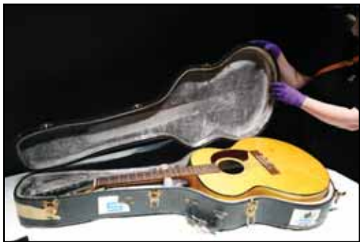
The Harptone 12-string acoustic guitar and case used by David Bowie on Ziggy Stardust and the Spiders from Mars and Let's Dance in 1970, is displayed.