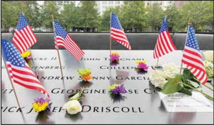
Flags and flowers are placed in the inscribed names at the National September 11 Memorial in New York on Sept 10.

the names of the attack victims will be read aloud by family and loved ones in a ceremony attended by Vice President JD Vance and his wife, second lady Usha Vance.