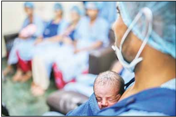
Nurses conduct a Sick Newborn Care Unit session for women whose newborns are premature or sick, at an intensive care unit of a government hospital in Gurugram, a satellite city of New Delhi, India, on Aug. 7, 2025.

Health’s India program, said her organization has trained millions of caregivers across India, Indonesia, Bangladesh and Nepal and equipped them with resources and skills needed for medical and emotional support. Training family members in caregiving can prove to be important when health systems are over stretched and healthcare worker shortages are common, Murthy said. “We have to look at being more efficient in addressing this critical gap,” she said.