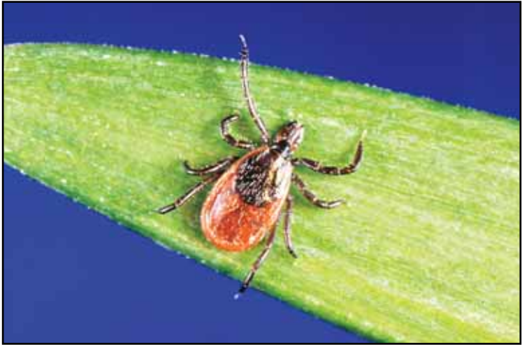
This undated photo provided by the US Centers for Disease Control and Prevention (CDC) shows a blacklegged tick, also known as a deer tick, a carrier of Lyme disease. (AP)

No simple test for Lyme ... doctors use multiple clues