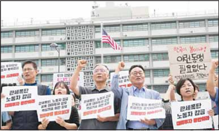
Protesters stage a rally against the detention of South Korean workers during an immigration raid in Georgia, near the U.S. Embassy in Seoul, South Korea, Tuesday, Sept. 9, 2025. The signs read 'A tariff bomb and workers confinement.'

The workers had been held at an immigration detention center in Folkston, 285 miles (460 kilometers) southeast of Atlanta. South Korea's Foreign Ministry confirmed that U.S. authorities have released the 330 detainees - 316 of them Koreans - and that they were being driven by bus to Hartsfield-