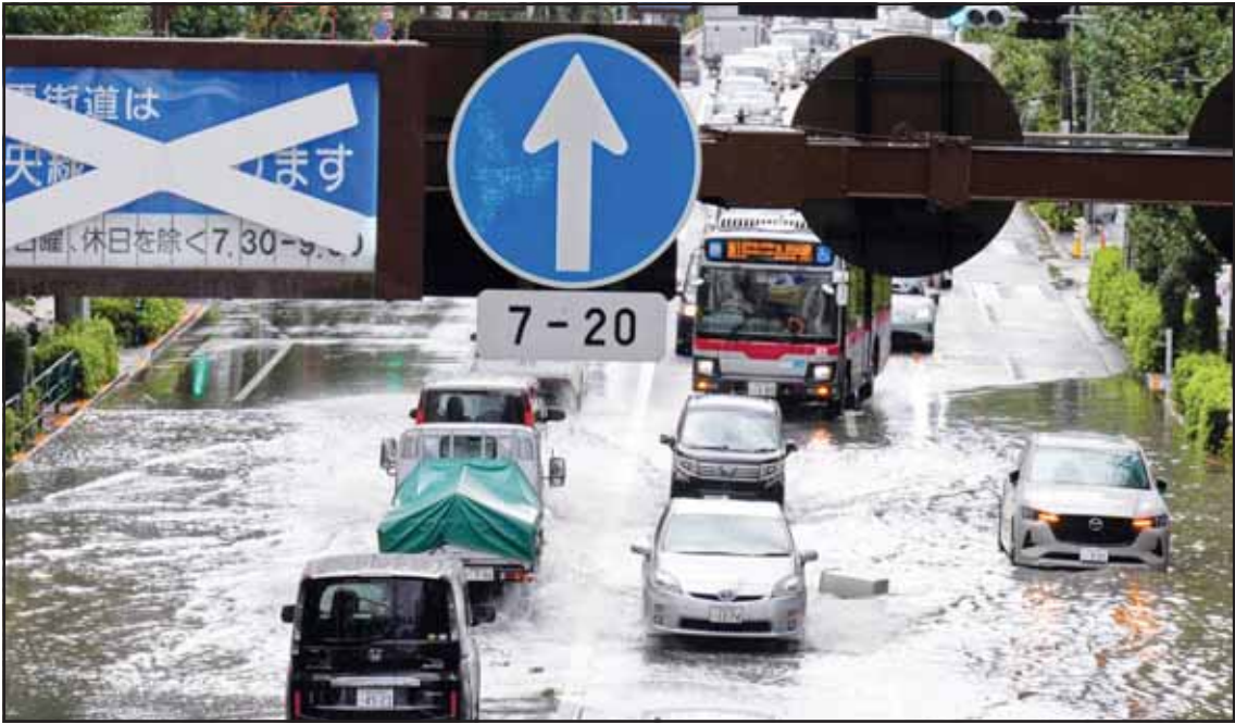
Vehicles drive through a flooded road caused by heavy rain on Sept 11.