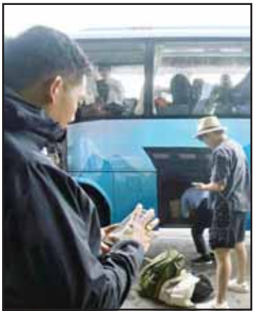
Tourists arrive to take their flight after Nepal's international airport which was closed due to nationwide protests reopens in Kathmandu, Nepal on Sept 11.