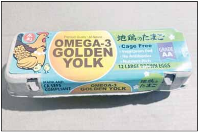
This undated photo released by the US Food and Drug Administration, shows a carton of large brown cage free ‘sunshine/omega-3 golden’ yolk eggs sourced from Country Eggs, LLC.

NEW DELHI, Aug. 30, (Xinhua): Authorities in Delhi have ordered the closure of the National Zoological Park to visitors starting Saturday after the confirmation of bird flu in two bird carcasses, officials said. The authorities have also instructed officials at the zoo to follow the protocol for avian influenza. Reports said that following the deaths of painted storks and black-necked ibises at the park, routine samples from the dead birds were sent to the ICAR-National Institute of High Security Animal Diseases on Aug. 27, where H5N1 was confirmed in two of the samples. Bird flu, a highly infectious and severe respiratory disease in birds caused by the H5N1 influenza virus, can occasionally infect humans as well.