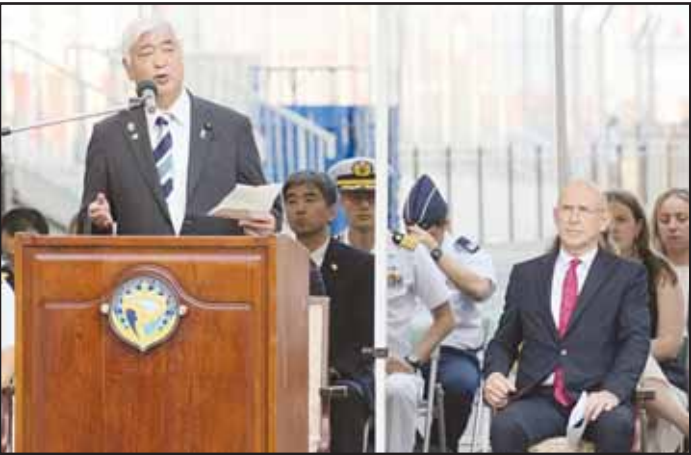
Japan's Defense Minister Gen Nakatani, left, delivers a speech as Britain's Secretary of State for Defence John Healey attends a welcome ceremony for the Royal Navy aircraft carrier HMS Prince of Wales during its port call in Tokyo on Aug 28.

The two countries are involved in the development of a fighter jet for deployment by 2035 in a trilateral cooperation known as the Global Combat Air Program that also in-