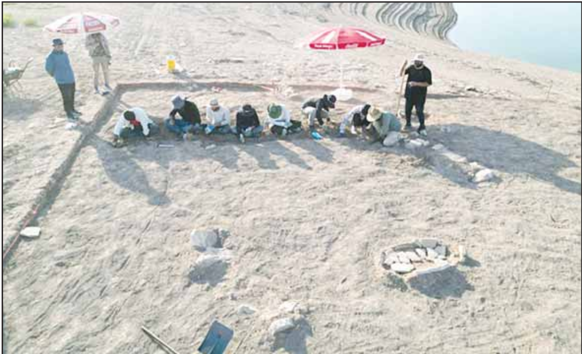
Archaeologists discover an ancient city dating back around 5,000 years in Iraq’s Kurdistan region.