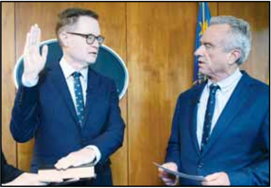
In this photo provided by the Department of Health and Human Secretary, Robert F. Kennedy, Jr., (right), conducts the swearing-in ceremony of Jim O’Neill as the Department’s Deputy Secretary, June 9, 2025, in Washington.

proach, as commissioner. After being nominated to the HHS post, O’Neill voiced his support for the federal government’s traditional system for overseeing vaccines - including the role of the CDC - while refusing to criticize Kennedy’s views on the topic. “I support CDC’s recommendations for vaccines,” O’Neill told Louisiana Republican Sen. Bill Cassidy at a confirmation hearing in June. “I think that’s a central role that CDC has. It’s mandated in law.” In follow-up questions, Democrat Ron Wyden pressed O’Neill on statements by Kennedy downplaying the safety