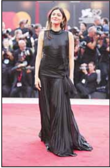
Monica Barbaro poses for photographers on the red carpet during the 82nd edition of the Venice Film Festival in Venice, Italy, on Friday, Aug. 29.

with technology, with AI, with wars ... climate change."