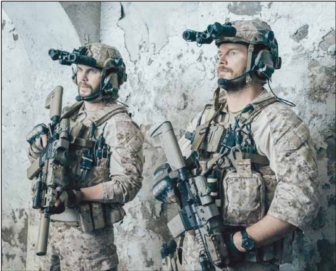
This image released by Amazon Prime shows Taylor Kitsch, (left), and Chris Pratt in a scene from ‘The Terminal List: Dark Wolf.’

Shchedrin’s work ranged from choral music and concertos to opera and ballet, blending Russian folk influences, classical traditions and avant-garde technique.