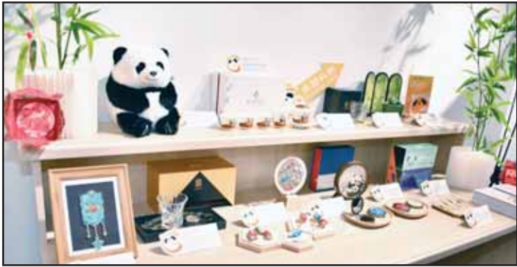
Explore the ‘Chengdu Gifts’ Cultural and Creative Exhibition at the China Cultural Center in Kuwait, showcasing Tianfu culture through innovative art, traditional crafts, and contemporary design.