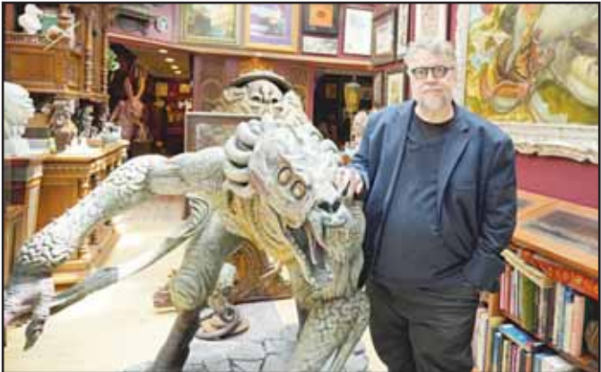
Guillermo del Toro poses for a portrait on Tuesday, Aug. 12, 2025, at his ‘Bleak House’ in Santa Monica, Calif.