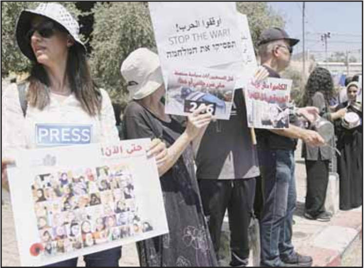
Palestinian and Israeli activists and journalists take part in a protest against the killing of Palestinian journalists in the Gaza Strip, as they gather in Nazareth, Israel, Friday, Aug. 29.