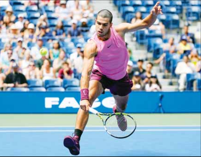
Carlos Alcaraz, of Spain, returns a shot to Luciano Darderi, of Italy, during the third round of the U.S. Open tennis championships, Friday in New York.