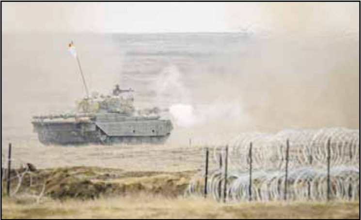
A tank fires during the Steadfast Dart 2025 exercise, involving multiple nations and representing one of the largest NATO operations planned this year, at a training range in Smardan, eastern Romania on Feb 19. (AP)

BRUSSELS, Aug 30, (AP): NATO released data showing that all its 32 members are projected to finally meet a longstanding goal of spending 2% of their overall economic output on defense this year, while only three meet a new goal set at 3.5% of GDP agreed in June. A push for higher defense spending is one result of Russia’s war in Ukraine, which has created profound security concerns across Europe. It is also a reaction to pressure from U.S. President Donald Trump, who has repeatedly accused European allies of not investing enough in their own security. Trump has warned Europeans that Washington might not defend those who fail to meet commitments. All 32 alliance members are expected to reach the 2% goal this year for the first time, marking a significant change since 2023, when just 10 allies met that benchmark, the NATO report said. Alliance members agreed at summit in June to hike defense spending from 2% to 3.5% and to require a further commitment of 1.5% of GDP for spending on other measures, such as upgrading roads, bridges, ports and airfields so armies can better deploy and establishing measures to counter cyber and hybrid attacks and preparing societies for future conflict. Germany was the sole country ex-