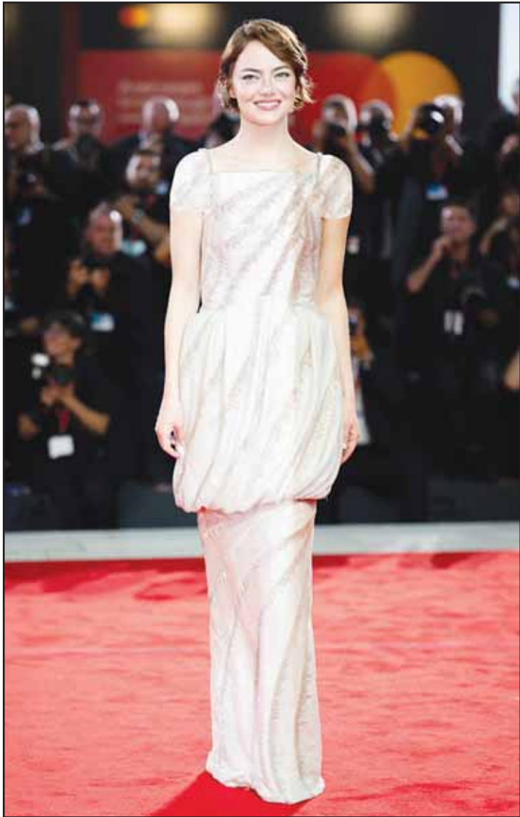
Emma Stone poses for photographers on the red carpet for the film 'Bugonia' during the 82nd edition of the Venice Film Festival in Venice, Italy, on Thursday, Aug. 28.

This is Stone's fourth time working with Lanthimos and Plemons' second. Both recently appeared in the film "Kinds of Kindness." Lanthimos last had a film at Venice in 2023, when "Poor Things" won the Golden Lion prize. It went on to win