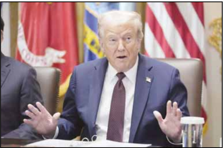
US President Donald Trump speaks during a cabinet meeting on Aug 26, at the White House in Washington.

WASHINGTON, Aug 30, President Donald Trump has told House Speaker Mike Johnson that he won’t be spending $4.9 billion in congressionally approved foreign aid, effectively cutting the budget without going through the legislative branch. Trump, who sent a letter to Johnson, R-La., on Thursday, is using what’s known as a pocket rescission - when a president submits a request to Congress to not spend approved funds toward the end of the fiscal year, so Congress cannot act on the request in a 45-day timeframe and the money goes unspent as a result. It’s the first time in nearly 50 years a president has used one. The fiscal year draws to a close at the end of September. The letter was posted Friday morning on the X account of the White House Office of Management and Budget. It said the funding would be cut from the State Department and the U.S. Agency for International Development, or USAID, an early target of Trump’s efforts to cut foreign aid. If the White House standardizes this move, the president could effectively bypass Congress on key spending choices and potentially throw into disarray efforts in the House and the Senate to keep the government funded when the next fiscal year starts in October.