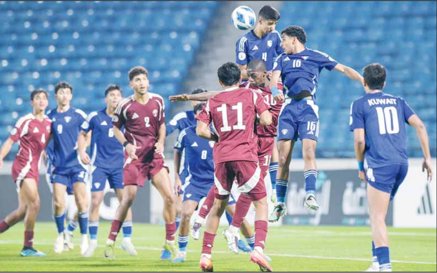
Kuwaiti players jump for the ball during the opening match between Kuwait and Qatar.

By Khaled Al-Enezi Al-Seyassah/Arab Times Staff