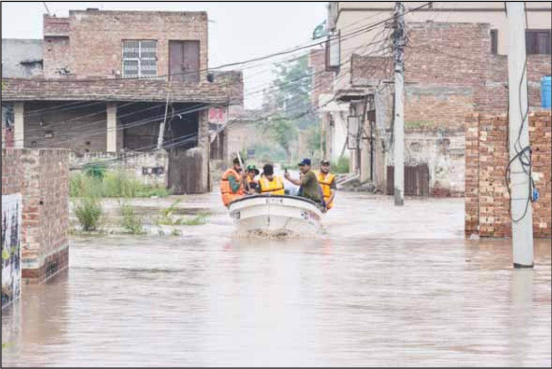
Rescue workers search for trapped people in a flooded area after torrential rains and rising water level in the Ravi river due to sudden water releases from Indian dams, on the outskirts of Lahore, Pakistan on Aug 29.

Chusak said that the cabinet approved a strict framework for its operations during this transitional period to ensure stability without exceeding its mandate.