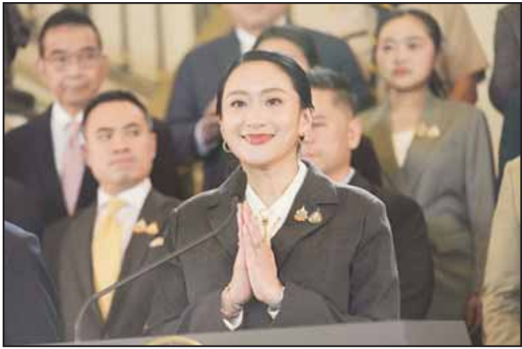
Thailand's suspended Prime Minister Paetongtarn Shinawatra attends a press conference after being dismissed from her position, in Bangkok, Thailand on Aug 29.

Audio of the call was leaked online by Hun Sen, who was Cambodia's prime minister for 38 years until his son Hun Manet took over the job in