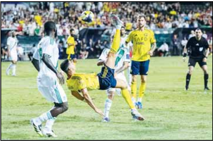
Al Nassr's Cristiano Ronaldo takes a shot during the Saudi Super Cup final soccer match between Al Ahli and Al Nassr at the Hong Kong Stadium in Hong Kong.