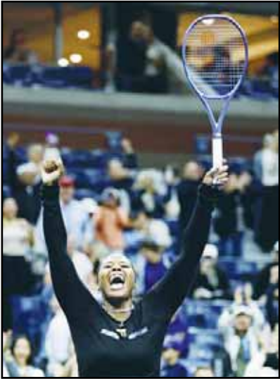
Taylor Townsend, of the United States, reacts after defeating Mirra Andreeva, of Russia, during the third round of the U.S. Open tennis championships, in New York.

No. 10 Emma Navarro in three sets. No. 4 Taylor Fritz won a late match but No. 6 Ben Shelton and No. 17 Frances Tiafoe were eliminated, leaving just two American men remaining. Meanwhile, Novak Djokovic believes his tennis is still good enough to compete for a 25th Grand Slam title. It's his body that has to show it can hold up. Djokovic shook off a back problem early in the match to beat Cam Norrie on Friday night and, at 38, become the oldest man to reach the fourth round of the U.S. Open since Jimmy Connors was the same age in 1991. Djokovic pulled away to win 6-4, 6-7 (4), 6-2, 6-3, helped by hitting 18 aces in what he said was his best serving performance of a tournament in which he needed treatment for a blister on his big toe in the first round and for his back in the third. "The wear and tear on the body all these years is taking a toll, and I'm aware of it, but I'm resisting it," Djokovic said. "I'm trying to do my best to still be out there competing with the young guys in the highest level." The 24-time Grand Slam champion seemed in jeopardy of matching his earliest exit in Flushing Meadows when he needed medical attention near the end of the first set. But he recovered to reach the last 16 of a major for the 69th time, matching Roger Federer for most ever, and will next face German qualifier Jan-Lennard Struff.