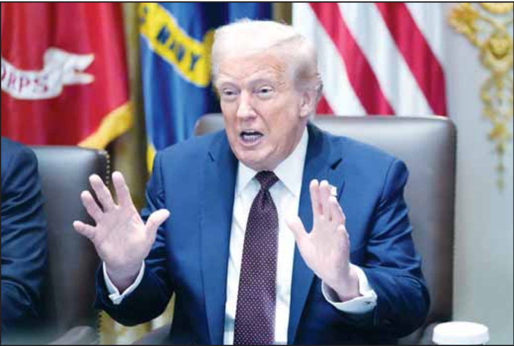
President Donald Trump speaks during a cabinet meeting, Tuesday, Aug. 26, 2025, at the White House in Washington.