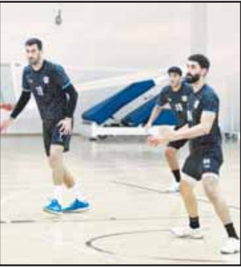
Highlights from Al-Salmiya's handball training camp in Doha.

Meanwhile, the Kuwait Club returned from its Bosnian training camp, alongside Al-Arabi's squad, who also concluded its preparations in Bosnia. Al-Arabi is gearing up to host the