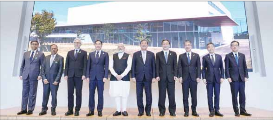
Indian Prime Minister Narendra Modi, center left, and Japanese Prime Minister Shigeru Ishiba, center right, pose for a group photo as they visit a factory of Tokyo Electron Limited in Taiwacho, Miyagi prefecture Saturday, Aug. 30, 2025. (AP)

TOKYO, Aug 30, (AP): The leaders of India and Japan agreed Friday to bolster economic ties while also boosting cooperation in areas including clean energy and defense, as the two Asian powers face common challenges such as China’s growing influence and U.S. tariffs. Following their summit in Tokyo, Indian Prime Minister Narendra Modi and Japanese Prime Minister Shigeru Ishiba agreed on a goal of boosting Japanese private investment in India to about $6.8 billion a year over the coming decade, up from about $2.7 billion a year in the 2010s. They also agreed to increase exchanges of workers and students to half a million people in the coming five years. The two governments hope India’s young workforce can help address labor shortages caused by Japan’s aging and declining population. “We believe that Japanese technology and Indian talent are a winning combination,” Modi told a news conference. The two leaders released a “joint vision” of cooperation for the next decade in areas such as security, defense, clean energy, technology and space, and signed a total of 11 documents. “As the economies and vibrant democracies of the world, partnership is extremely important not just for our two countries but for global peace and stability as well,” Modi said. “We need to have to take advantage of each other’s strengths, to bring solutions to our challenges and to help each other,” Ishiba said. On Sunday, Ishiba will escort Modi on a bullet train to