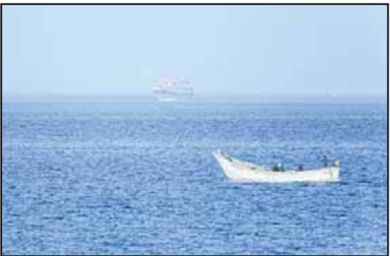
Fishermen are seen at sea in Nouadibou, Mauritania, on Jan 7.

Cruz said he met with Mexico's Foreign Affairs Secretary Juan Ramón de la Fuente and other officials, speaking largely on security and migration issues.