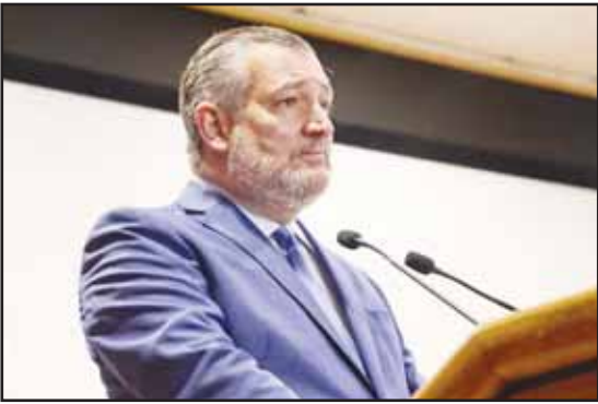
US Sen Ted Cruz, speaks with reporters about his visit in Mexico City on Aug 29.

"The United States is not going to come to Mexico with their military," Sheinbaum said earlier this month. "We cooperate, we collaborate, but there will be no invasion. It's off