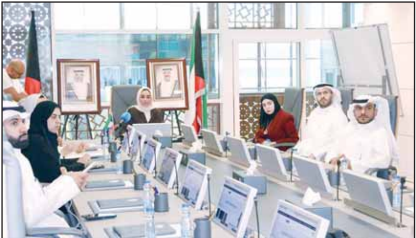
Dr. Amthal Al-Huwailah, Minister of Social Affairs, Family and Childhood Affairs and Chairperson of the Supreme Council for Family Affairs.