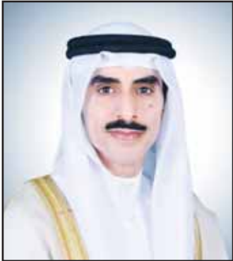
Sheikh Thamer Al-Jaber

terior's state security department from 1994 to 2000.