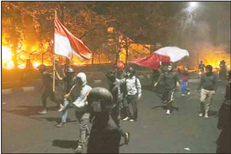
Protesters walk by as the local parliament building is engulfed in flames during a protest following the death of a delivery rider in clashes between riot police and students protesting against lawmakers' allowances in Makassar, South Sulawesi, Indonesia on Aug 29.

Foreign embassies in Jakarta, including the US, Australia and Southeast Asian countries, have advised their citizens in Indonesia to avoid demonstration areas or large public gatherings.