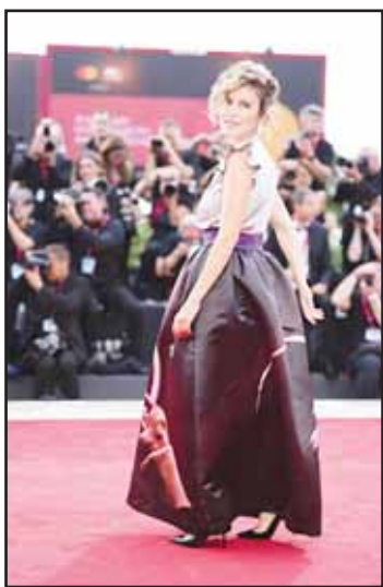
Noemi Brando poses for photographers on the red carpet during the 82nd edition of the Venice Film Festival in Venice, Italy, on Friday, Aug. 29.

"Humanity is facing a reckoning very soon," Lanthimos said. "People need to choose the right path in many ways otherwise I don't know how much time we have with everything that's happening in the world