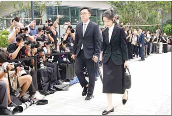
Kim Keon Hee, (right), the wife of South Korea's ousted former president Yoon Suk Yeol, arrives at the special prosecutor's office in Seoul, South Korea on Aug 6.

A separate team led by Special Prosecutor Cho Eun-suk said former Prime Minister Han Duck-soo was charged