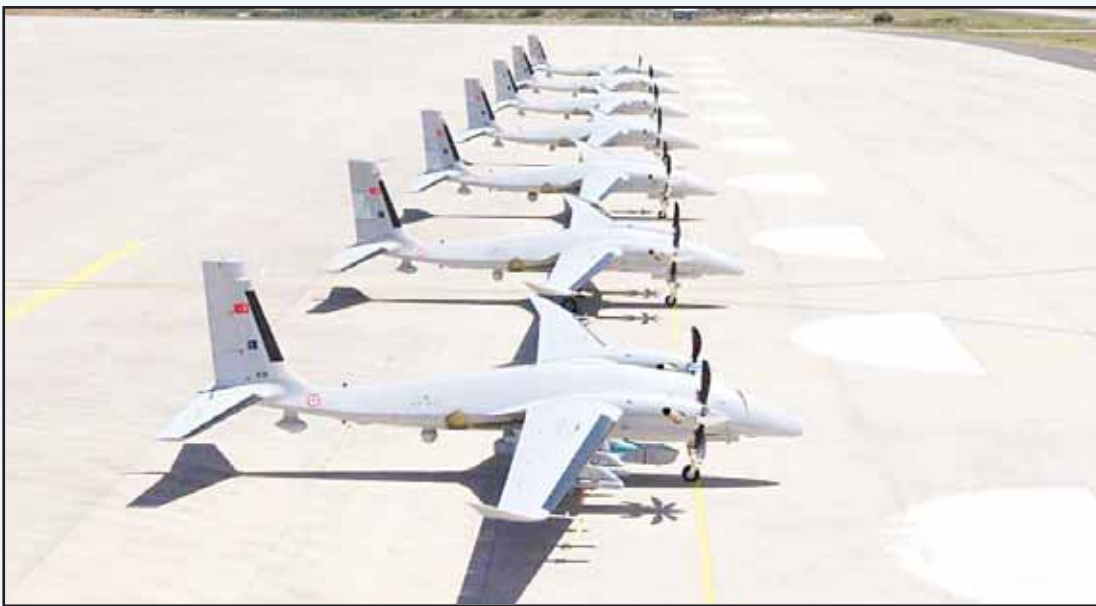
A variety of products exported, including advanced fighter jets, UAVs, land vehicles, naval platforms, and munitions.