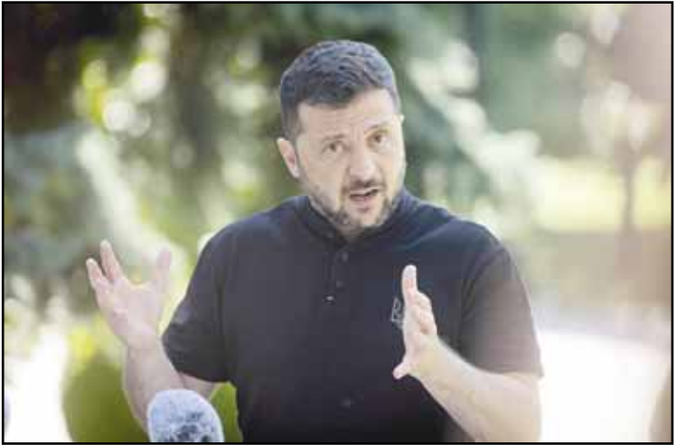
Ukrainian President Volodymyr Zelenskyy talks during his press conference in Kyiv, Ukraine on Aug 29. (AP)

KYIV, Ukraine, Aug 30, (AP): Ukrainian President Volodymyr Zelenskyy said that Ukrainian officials want to meet with U.S. President Donald Trump and European leaders next week to discuss recent developments in efforts to end the three-year war with Russia. The proposed meetings appeared designed to add momentum to the push for peace, as Zelenskyy expressed frustration with what he called Russia’s lack of constructive engagement in the process while it continues to launch devastating aerial attacks on civilian areas. Trump has bristled at Russian leader Vladimir Putin’s stalling on an US proposal for direct peace talks with Zelenskyy, and said a week ago he expected to decide on next steps in two weeks if direct talks aren’t scheduled. Trump complained last month that Putin “talks nice and then he bombs everybody.” But he has also chided Ukraine for its attacks. At an emergency meeting of the UN Security Council on Friday, the United States warned Russia to move toward peace and meet with Ukraine or face possible sanctions. The meeting was called after a major Russian missile and drone attack on Ukraine overnight from Wednesday to Thursday that killed at least 23 people.