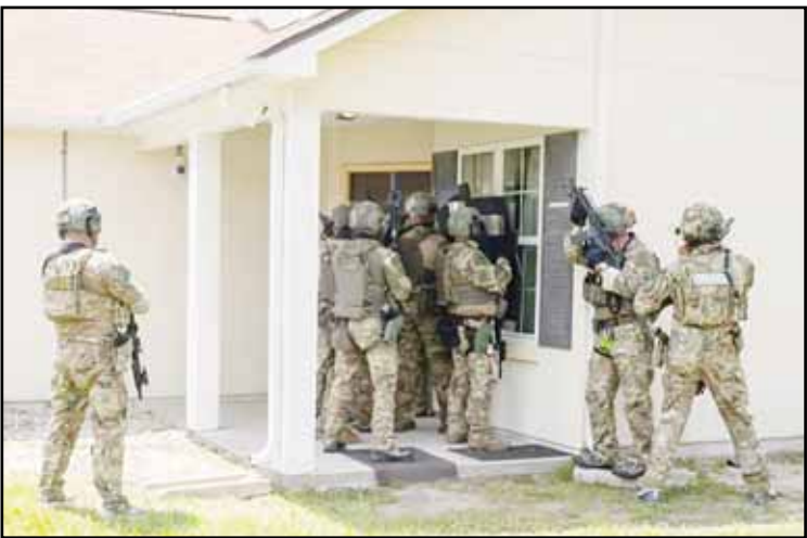
Immigration and Customs Enforcement (ICE) Special Response Team members demonstrate how the team enters a residence in the pursuit of a wanted subject at the Federal Law Enforcement Training Centers (FLETC) in Brunswick, Ga on Aug 21.

Congress affords them.” Cobb wrote in a 48-page opinion issued Friday night. “Were that right, not only non-citizens, but everyone would be at risk.” The Department of Homeland Security announced shortly after Trump came to office in January that it was expanding the use of expedited removal, the fast-track deportation of undocumented migrants who have been in the US less than two years. The effort has triggered lawsuits by the American Civil Liberties Union and immigrant rights groups. Before the Trump administration’s push to expand such speedy deportations, expedited removal was only used for migrants who were stopped within 100 miles of the border and who had been in the U.S. for less than 14 days. Cobb, an appointee of former president Joe Biden, didn’t question the constitutionality of the expedited removal statute, or its application at the border. “It merely holds that in applying the statute to a huge group of people living in the interior of the country who have not previously been subject to expedited removal, the Government must afford them due process,” she wrote.