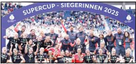
Bayern's players celebrate winning the DFB Supercup soccer match between Bayern Munich and VfL Wolfsburg, at the BBBank Wildpark in Karlsruhe, Germany.