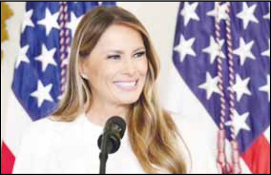
First lady Melania Trump speaks during an event unveiling a US Postal Service Stamp honoring former first lady Barbara Bush, May 8, 2025, in the East Room of the White House in Washington.