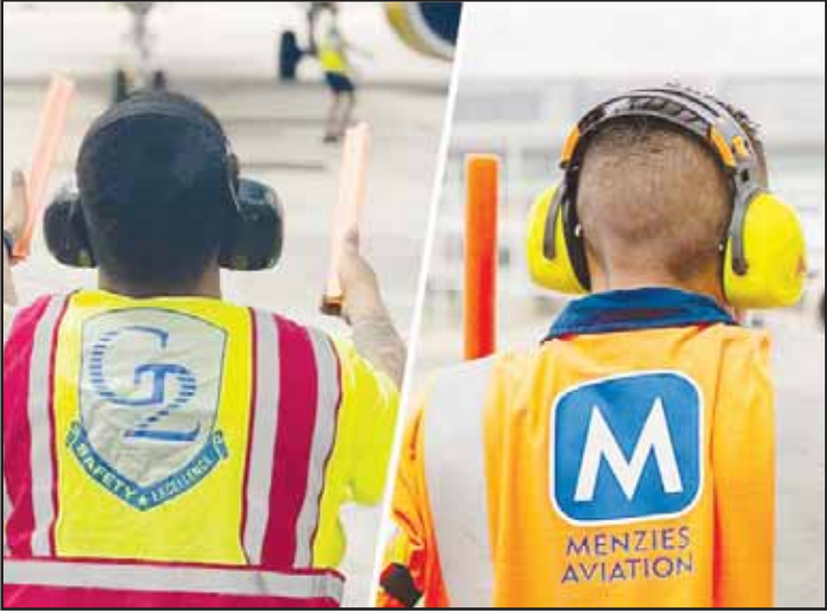
G2 and Menzies Aviation join forces.