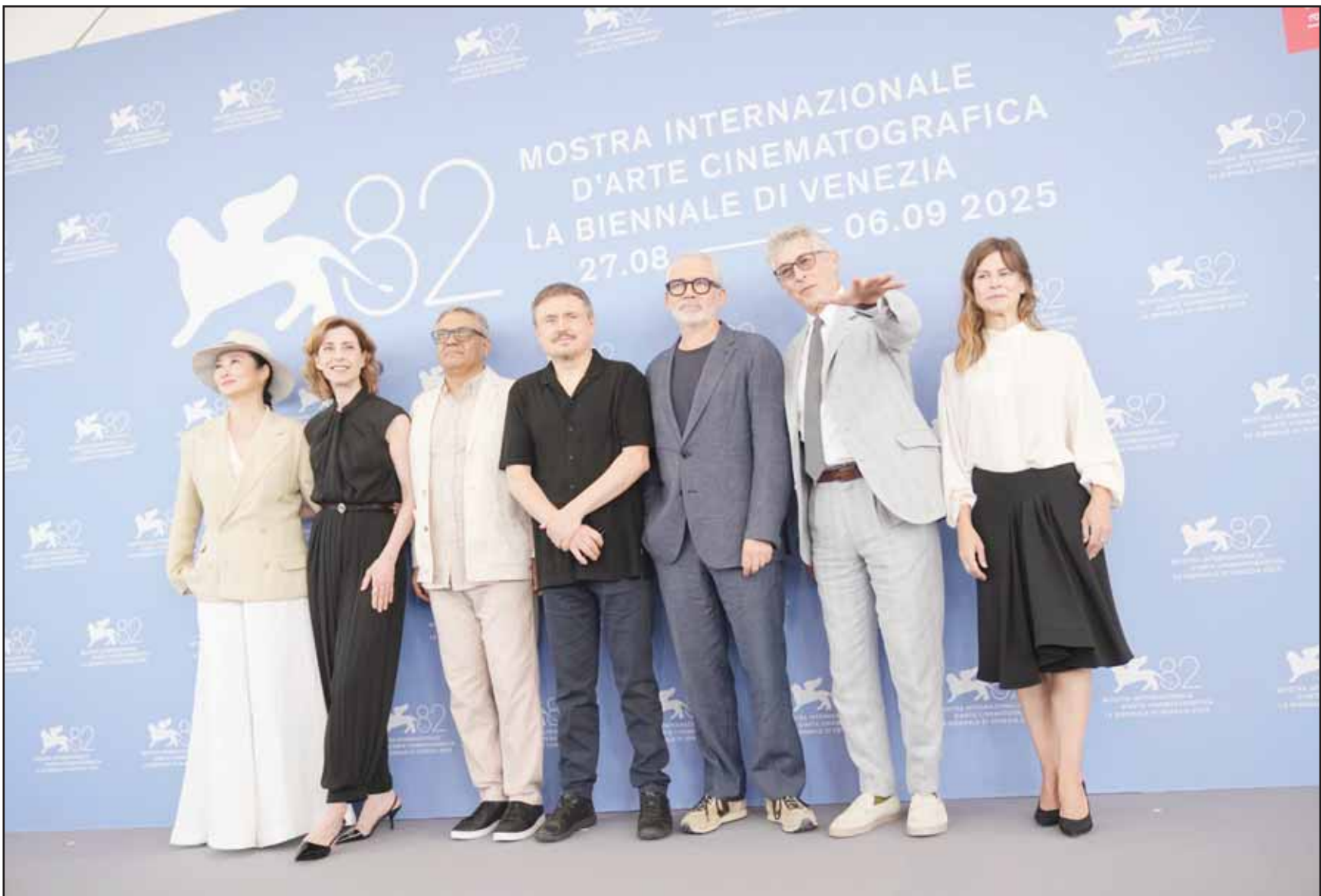
Jury president Alexander Payne, (sixth from left), and jury members Zhao Tao, (from left), Fernanda Torres, Mohammad Rasoulof, Cristian Mungiu, Stephane Brize and Maura Delpero pose for photographers at the Jury photo call during the 82nd edition of the Venice Film Festival in Venice, Italy, on Wednesday, Aug. 27.