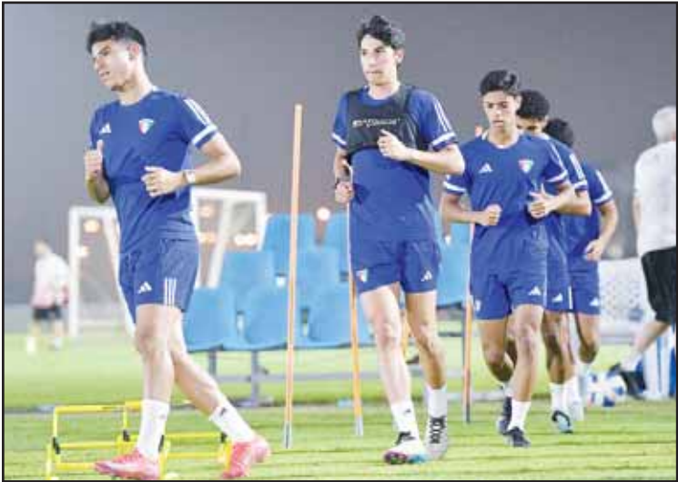
Players hold their final training session.