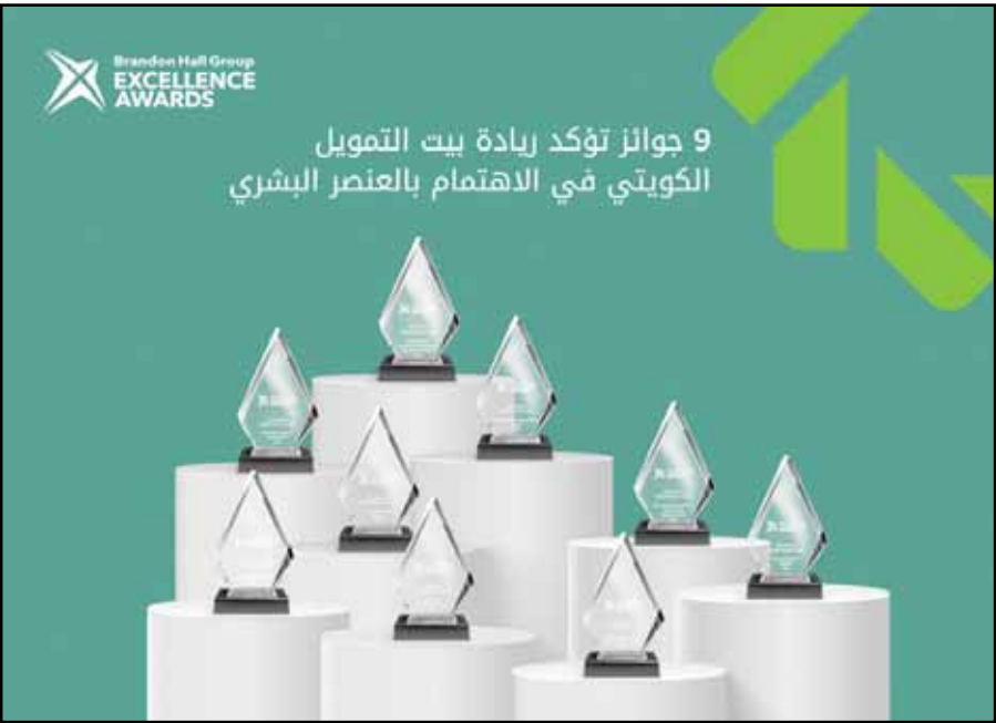
Brandon Hall award

He affirmed the Bank's continuous strat-