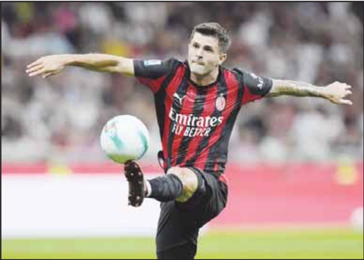
AC Milan's Christian Pulisic is in action during a Serie A soccer match between AC Milan and Cremonese, at the San Siro stadium in Milan, Italy.

NEW YORK, Aug 27, Christian Pulisic is back with the U.S. national team following his spat with coach Mauricio Pochettino. "I think it's behind us, all that happened in summer, and I think now we need to look forward," Pochettino said Tuesday after announcing his 22-man roster for friendlies against South Korea on Sept. 6 at Harrison, New Jersey, and Japan three days later at Columbus, Ohio. Pulisic, the top American player, offered to play in June friendlies against Turkey and Switzerland ahead of the CONCACAF Gold Cup but didn't want to participate in the tournament, an offer that Pochettino rejected. The 26-year-old played in about 100 club matches during his first two seasons with AC Milan and wanted an extensive break in the summer before the U.S. hosts next year's World Cup, a decision criticized by several former U.S. stars. Pochettino said he hasn't spoken with Pulisic since the flap because there was no need. He made some surprising picks for his September roster, saying this is "the last camp to have the possibility for us to see players, new faces," and maintained no World Cup starting assignments or roster spots are assured. "Player(s) need to feel the threat from your teammate," he said. "They need to defend their place in every single possibility."