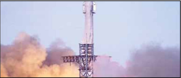
SpaceX's mega rocket Starship makes a test flight from Starbase, Texas, Tuesday, Aug. 26.