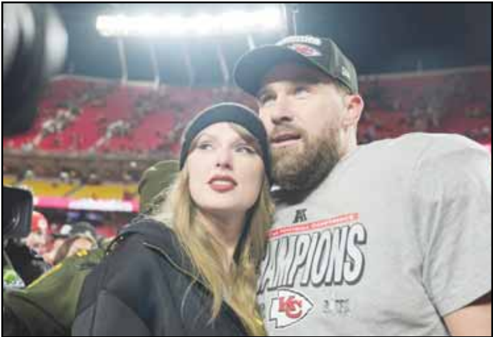
Kansas City Chiefs tight end Travis Kelce, (right), is congratulated by Taylor Swift as they celebrate the Chiefs victory over the Buffalo Bills in the AFC Championship NFL football game, Jan. 26, 2025, in Kansas City, Mo.

didn’t. “We don’t, really. I don’t see a lot of things,” she said. “My name can be in the actual headline, and it’s none of my business.” The pair started dating during Swift’s landmark Eras tour - though Kelce, despite bearing a friendship bracelet, was thwarted in his first attempt to meet Swift at her concert at Arrowhead Stadium. But by September, Swift was back at the Kansas City stadium, cheering on Kelce next to his mother. Less than two months later, she was changing lyrics onstage: “Karma is the guy on the Chiefs, coming straight home to me,” she sang in Argentina as Kelce beamed from the audience. And come the 2024 Super Bowl, she raced across time zones and was there on the field when he won his third championship.