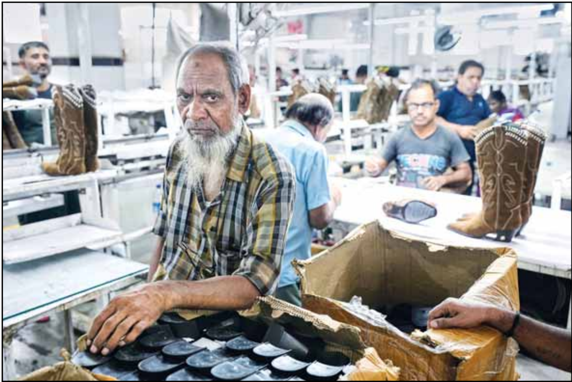
Workers at a manufacturing unit make leather footwear in Agra, India, Monday, Aug. 25, 2025.