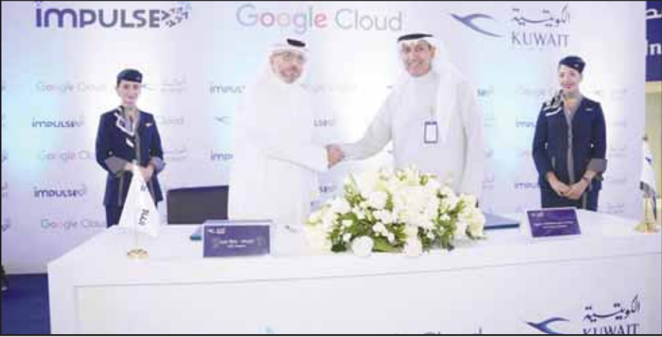
After signing the agreement.