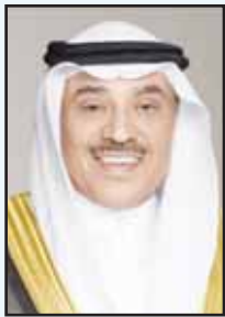
HH the Crown Prince