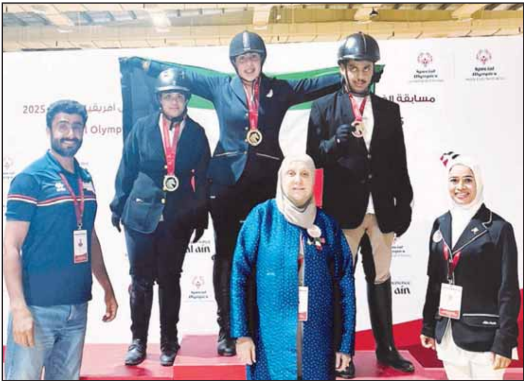
The dominant Kuwaiti riders celebrate on the podium.