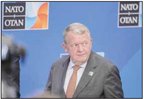
Denmark's Foreign Minister Lars Løkke Rasmussen arrives for the NATO summit in The Hague, Netherlands on June 25.

COPENHAGEN, Denmark, Aug 27, Denmark’s foreign minister had the top US diplomat in the country summoned for talks after the main national broadcaster reported Wednesday that at least three people with connections to President Donald Trump have been carrying out covert influence operations in Greenland. Trump has repeatedly said he seeks US jurisdiction over Greenland, a vast, semi-autonomous territory of Denmark. He has not ruled out military force to take control of the mineral-rich, strategically located Arctic island. Denmark, a NATO ally of the US, and Greenland have said the island is not for sale and condemned reports of the U.S. gathering intelligence there. Danish public broadcaster DR reported Wednesday that government and security sources which it didn’t name, as well as unidentified sources in Greenland and the U.S., believe that at least three Americans with connections to Trump have been carrying out covert influence operations in the territory. One of those people allegedly compiled a list of US-friendly Greenlanders, collected names of people opposed to Trump and got locals to point out cases that could be used to cast Denmark in a bad light in American media. Two others have tried to nurture contacts with politicians, businesspeople and locals, according to the report. An influence operation is an organized effort to shape how people in a society think in order to achieve certain political