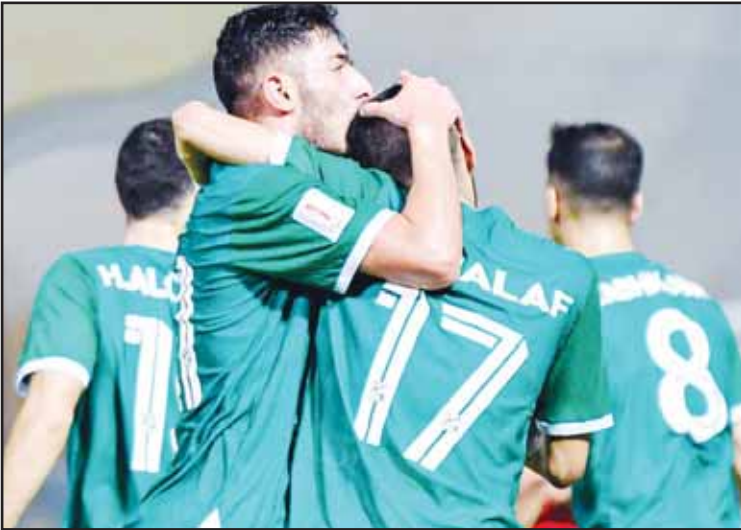
A file photo of Al Arabi players celebrating.