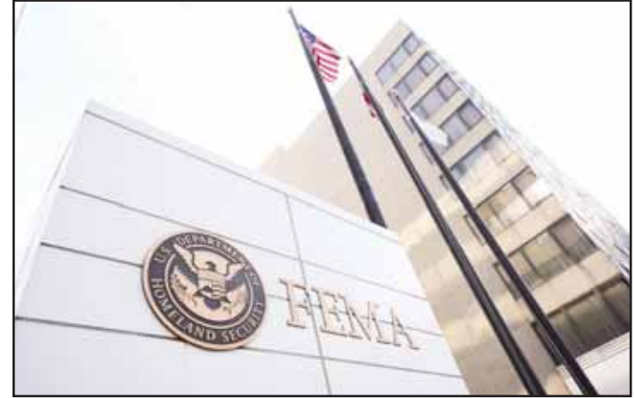
The Federal Emergency Management Agency headquarters is photographed in Washington on May 5.

WASHINGTON, Aug 27, (Xinhua): The Trump administration on Tuesday asked the US Supreme Court to allow it to withhold billions of U.S. dollars in foreign aid, challenging a federal court injunction that forces the government to continue payments. The US Justice Department filed an emergency appeal, noting that a three-judge panel of the US Court of Appeals for the DC Circuit ruled to overturn the injunction earlier this month. However, the injunction remains in effect, as the full federal appeals court declined to pause it last week. It ordered the Trump administration to pay nearly 2 billion dollars in outstanding aid to foreign aid contractors worldwide. In March, the Supreme Court declined to let the administration avoid making these payments. The Trump administration is now pressing for a definitive ruling, arguing that without the justices’ intervention, it would be forced to make payments, which would override executive foreign-policy decisions. US President Donald Trump imposed a 90-day pause on all foreign aid on Jan. 20, and has since gradually weakened the US Agency for International Development while exploring moving the agency under the