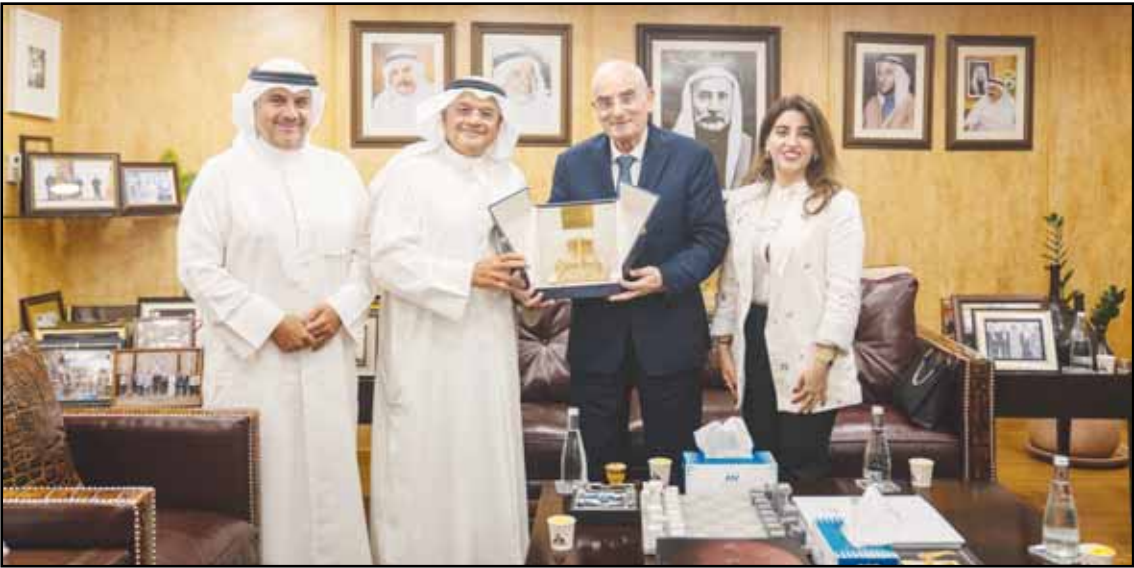
Lebanese Defense Minister visits Ali Abdulwahab Al Mutawa Co.