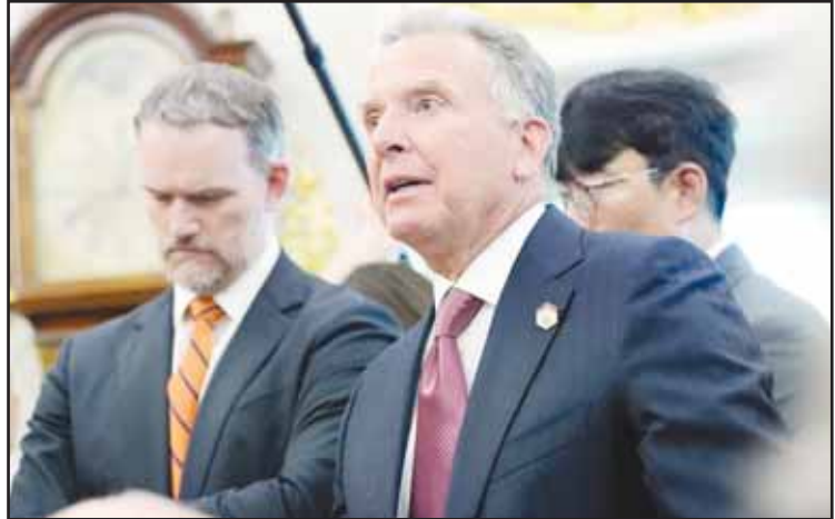
Special Presidential Envoy Steve Witkoff listens as President Donald Trump meets with South Korean President Lee Jae Myung in the Oval Office of the White House, on Aug 25 in Washington.