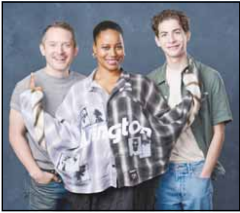
Elijah Wood, (from left), Taylor Paige, and Jacob Tremblay pose for a portrait to promote 'The Toxic Avenger' during Comic-Con International on July 24, 2025, in San Diego.