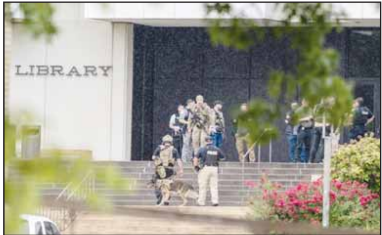
Law enforcement officers gather in front of the library on the University of Arkansas campus while responding to reports of a shooting on Aug 25, in Fayetteville, Ark.