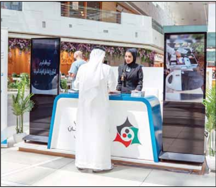
Ministry of Health launches Kuwait National Health Survey awareness campaign at the Avenues Mall.

It also prohibits photo editing using computer software, adding that head coverings are not permitted except for religious reasons.