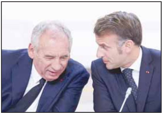
French President Emmanuel Macron, (right), and Prime Minister Francois Bayrou attend a meeting with New Caledonia’s elected officials and state representatives who have concluded a historic agreement allowing the creation of a ‘State of New Caledonia’ within the French Republic, at the Elysee Palace in Paris on July 12.

PARIS, Aug 27, France’s prime minister has announced a confidence vote next month that likely will lead to the collapse of his centrist government and prompt another period of political instability in the European Union’s second-biggest economy. François Bayrou said Monday he would seek approval for his unpopular budget plans on Sept. 8 at the National Assembly, France’s lower house of parliament. Opposition parties quickly said they would vote against it. President Emmanuel Macron, who has vowed to stay in office until the end of his term due in 2027, may soon face the complex task of appointing a new prime minister for the third time in a year. The prime minister focuses mostly on domestic policies, while the president retains substantial powers over foreign policy, European affairs and defense. Here’s a look at what’s at stake. Early legislative elections called by Macron in June last year led to a chaotic situation in parliament, divided among three minority blocs that do not have enough seats to govern alone. Bayrou, 74, has been in office since December. He unveiled plans last month to cut 44 billion euros ($51 billion) in spending, after France’s deficit hit 5.8% of gross domestic product last year, way above the official EU target of 3%. The plans includes removing two state holidays. Bayrou has no option beyond relying on the support - or at