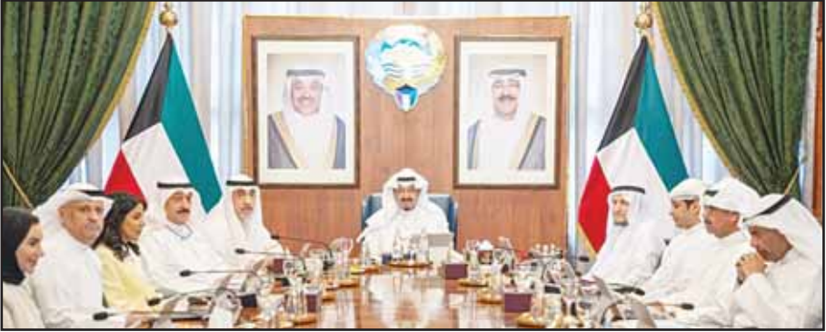
Cabinet's weekly meeting under the chairmanship of His Highness the Prime Minister Sheikh Ahmad Abdullah Al-Ahmad Al-Sabah.

KUWAIT CITY, Aug 27, (KUNA): The Kuwaiti Cabinet on Tuesday approved a proposal made by Minister of Information and Culture and Minister of State for Youth Affairs Abdulrahman Al-Mutairi to hold Kuwait Sports Day on February 7, 2026.