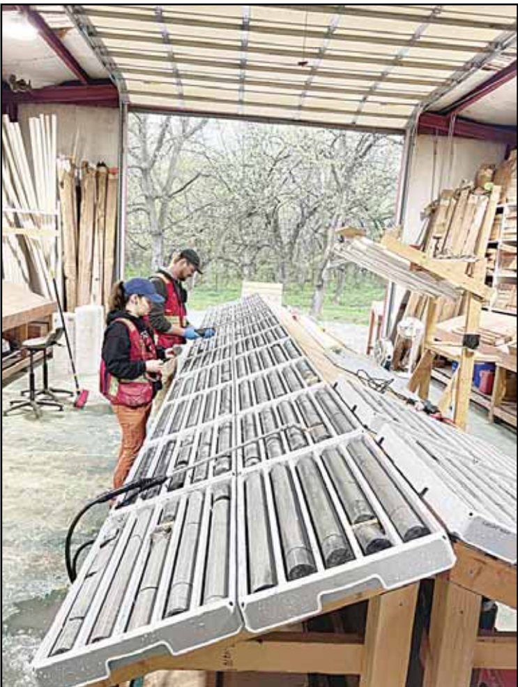
This photo provided by NioCorp shows geologists examining core samples taken from under southeast Nebraska near Elk Creek where NioCorp hopes to build a rare earths mine one day. (AP)

“It looks like we’re going to finally do something to address that issue and