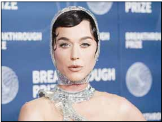
Katy Perry arrives at the 11th Breakthrough Prize Ceremony on April 5, 2025, in Los Angeles.

Asked if she had any role in a remodel of the house Bloom oversaw, Perry replied that she acted as "partner and advisor."