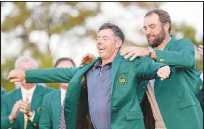
In this file photo, Scottie Scheffler puts the green Jacket on winner, Rory McIlroy, of Northern Ireland, at the Masters golf tournament, in Augusta, Ga. ment strengthens our organizations’ collective vision of rewarding top talent around the world who rise to the top of historic national open championships.” The Masters has the smallest field of the four majors and prefers it stay under 100 players to enhance their experience. Adding as many as six spots from the national opens meant losing the invitations to the PGA Tour’s weaker fall events. Last year, all eight winners in the fall were not already