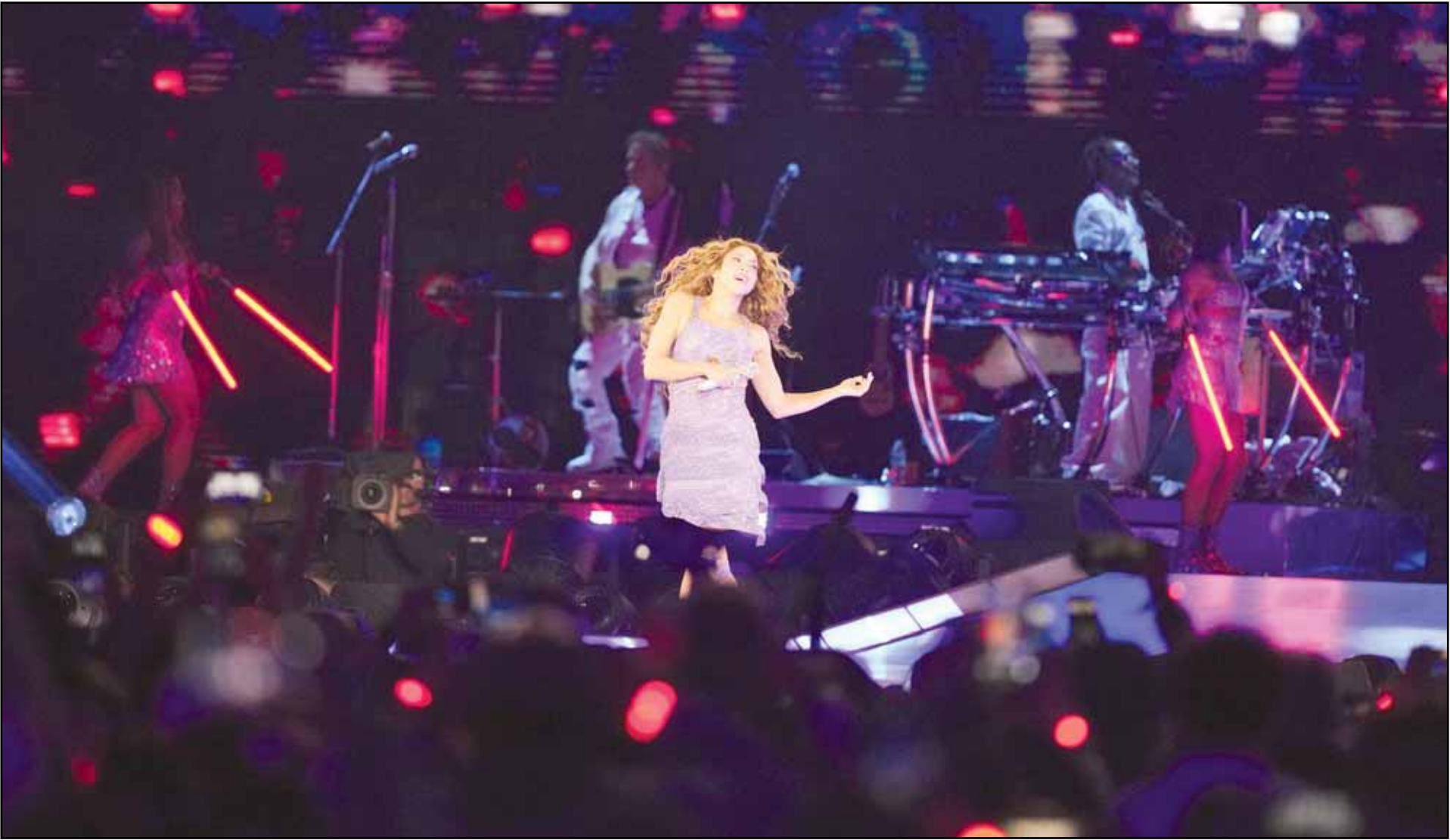
Colombian superstar Shakira performs during her ‘Las Mujeres Ya No Lloran’, or Women Don’t Cry Anymore world tour in Mexico City, Tuesday, Aug. 26.

Conan Gray and Tate McRae make VMA stage debuts