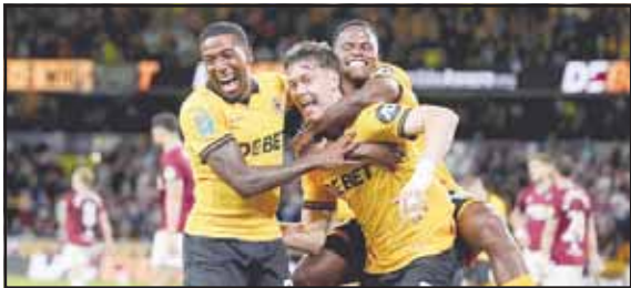
Wolverhampton Wanderers' Jorgen Strand Larsen, center, celebrates scoring during the English League Cup second round match between Wolverhampton Wanderers and West Ham United at Molineux Stadium, Wolverhampton, England. West Ham's miserable start to the season continued with a 3-2 loss at Wolverhampton in the second round of the English League Cup.