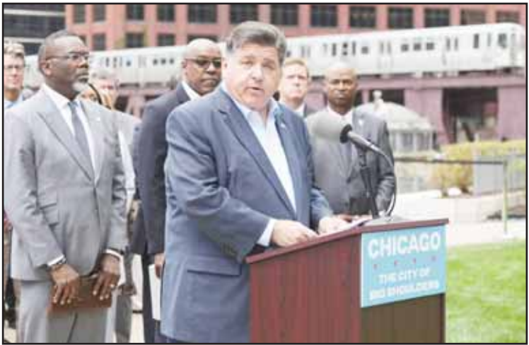
Illinois Governor JB Pritzker speaks during a news conference at River Point Park on Aug 25, in Chicago.

tion focuses its efforts on neighborhoods on the city’s West Side that have seen persistent crime, even as rates overall have fallen. “It’s not a war zone,” Johnson said. “They’re vibrant resilient communities where young people deserve opportunities and not intimidation.” On Tuesday, Trump called Chicago a “hell hole” and repeated that Chicagoans are asking “Trump to come in” to reduce crime in the city. The statements echoed comments earlier this month when Trump indicated Chicago may be next for a federal crackdown, claiming Chicago is “a mess” and residents are “screaming for us to come.” Trump has long singled out Chicago, making it a recurring theme on the campaign trail in both 2016 and 2024. He has drawn controversial comparisons between the city and war zones like Afghanistan, and in 2017, he vowed to “send in the feds” in response to gun violence. But data paints a more nuanced picture of crime - one that varies dramatically block by block and that has seen recent progress. Violent crime in Chicago dropped