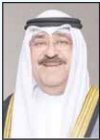
HH the Amir