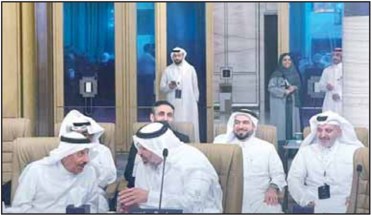
Chairman of the Kuwait Red Crescent Society (KRCS) during the 49th session of the General Assembly of the Arab Red Crescent and Red Cross Organization (ARCO).

He noted that the meeting agenda’s covered key humanitarian issues in Palestine, Lebanon, Syria, Yemen, Somalia, and the Comoros, in addition to challenges facing societies on the fields, as well as ways to boost capacity in handling recurring emergencies.