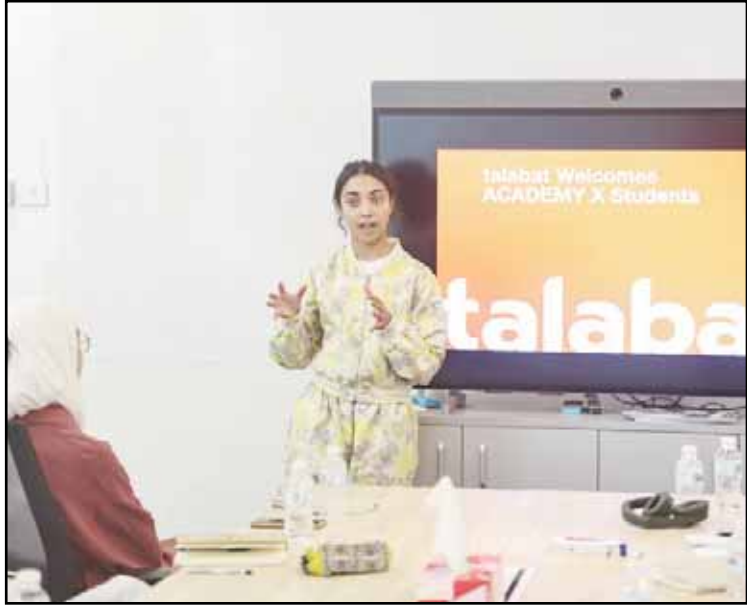
talabat - Academy X Students HQ visit

KUWAIT CITY, Aug 27: In continued efforts to inspire and support the future generation of leaders in Kuwait, talabat, the leading on-demand online ordering platform in the MENA region, hosted 30 students currently taking part in Academy X. The headquarters visit comes as part of talabat's social responsibility strategy and its ongoing sponsorship of Academy X, Kuwait's largest women's empowerment initiative in the tech and entrepreneurship industry, led by CODED Academy. It further aligns with the company's proactive role in advancing Kuwait's technology industry and digital economy, empowering women and young girls, and contributing to the goals of New Kuwait Vision 2035. Designed to complement students' Academy X journey, the talabat HQ visit included a number of dynamic workshops and discussions with employees from various departments, providing students with first-hand insight into the fast-evolving technology sector. The visit concluded with a competition that put the students' newly acquired Academy X skills to test, featuring challenges that incorporated use cases of AI tools and other app and web development solutions.