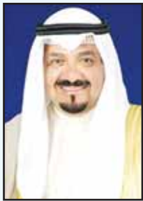
HH the Prime Minister