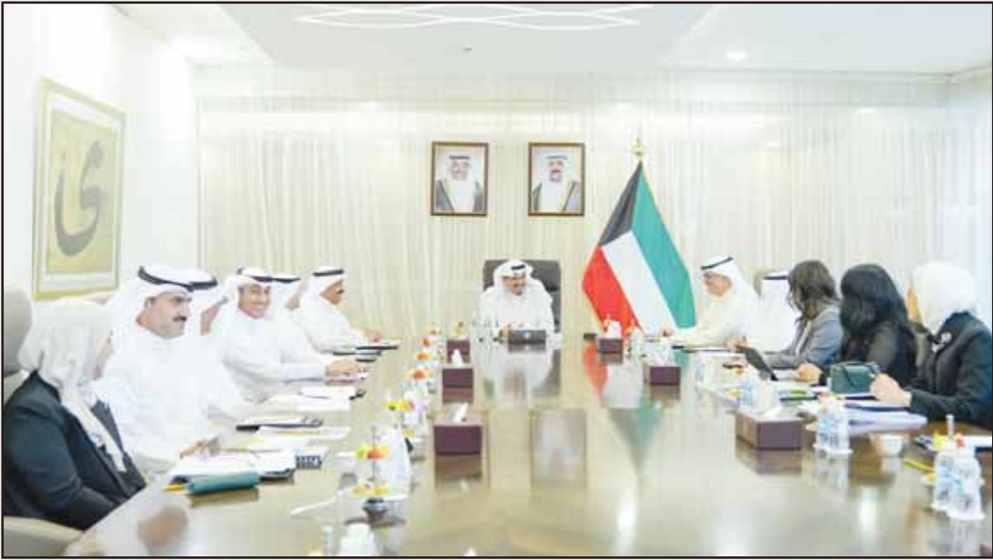
HH the PM chairs a meeting to discuss ways to generate revenue for the state through recycling disposable tires.