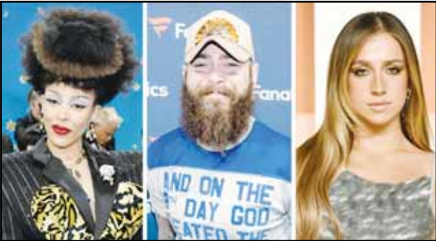
This photo combinations shows, (from left), Doja Cat, Post Malone, and Tate McRae.

handing out two new awards to decorated artists in the rap and Latin music genres. Rapper Busta Rhymes will receive the first ever MTV VMA Rock the Bells Visionary Award and Ricky Martin will be honored with the inaugural Latin Icon Award. The Rock the Bells Visionary Award celebrates the hip-hop star’s “boundary-breaking cultural impact and an indomitable musical career,” the announcement read. Rhymes, who has taken the VMAs stage various times since his first performance in 1997, will also perform during the ceremony. Martin, whose long VMAs history began with his first performance in 1999, will also perform, and be honored for a “four-decade career that launched Latin music and culture into the mainstream,”