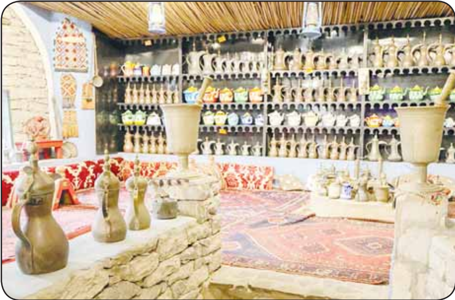
A collection of old coffee pots