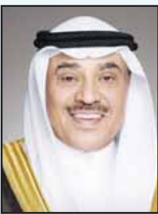
HH the Crown Prince