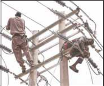
Workers fix electricity cables, previously destroyed during fighting between the Sudanese Armed Forces (SAF) and the paramilitary Rapid Support Forces (RSF), in Khartoum, Sudan on Aug 18.

The attack on the Kordofan village came as the RSF attempted to seize control of the crucial, oil-rich region following a series of battlefield set-