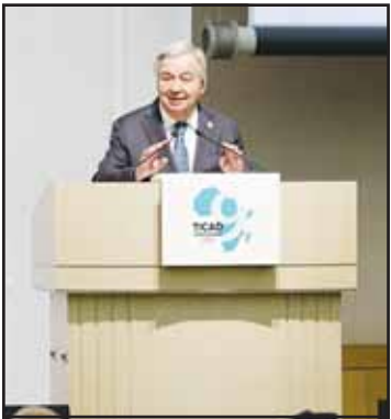
Secretary-General of the United Nations Antonio Guterres delivers a speech during the opening ceremony for The Ninth Tokyo International Conference on Africa Development (TICAD) in Yokohama, Japan on Aug 20.

In a video message marking World Humanitarian Day, Guterres said that while the rule is non-negotiable and is binding on all parties to conflict, always and everywhere, red lines are crossed with impunity. “The rules and tools exist,” the UN chief said. “What is missing is political will and moral courage.” “An attack on humanitarians is an attack on humanity,” he said. Guterres’ spokesman Stephane Dujarric said that Aug. 19 has been marked as World Humanitarian Day since 2009 because it is also the day back on Aug 19, 2003 when 22 UN aid