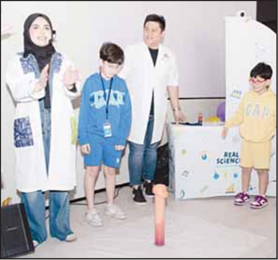
The Junior Banker of the day experience.