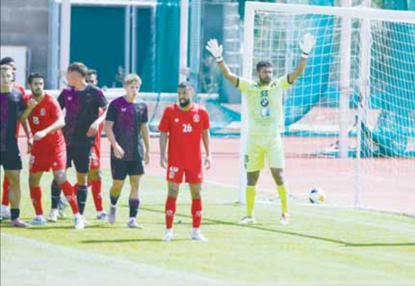
A glimpse of the Kuwait vs. Slavia Prague match.