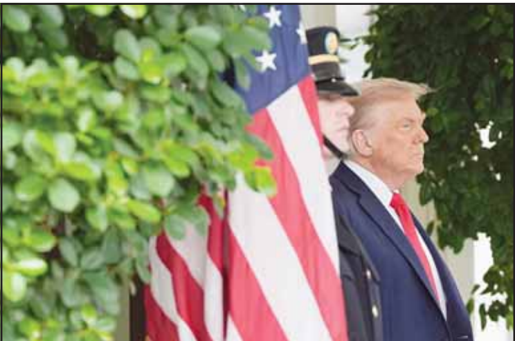
US President Donald Trump waits to greet Ukraine’s President Volodymyr Zelenskyy at the White House on Aug 18 in Washington.

defeated incumbent. In his second term, the president has locked down near-total loyalty from the GOP and stacked the administration with loyalists. The incumbent president’s party normally loses seats in Congress during midterm elections. That’s what happened to Trump in 2018, when Democrats won enough seats to take back the House of Representatives, stymieing the president’s agenda and eventually leading to his two impeachments. Trump has said he doesn’t want a repeat. He also has argued that his actions are actually attempts to preserve democracy. Repeating baseless allegations of fraud, he said Monday during a meeting with Ukrainian President Volodymyr Zelenskyy that “you can never have a real democracy with mail-in ballots.” Earlier this month, Trump said that, because he handily