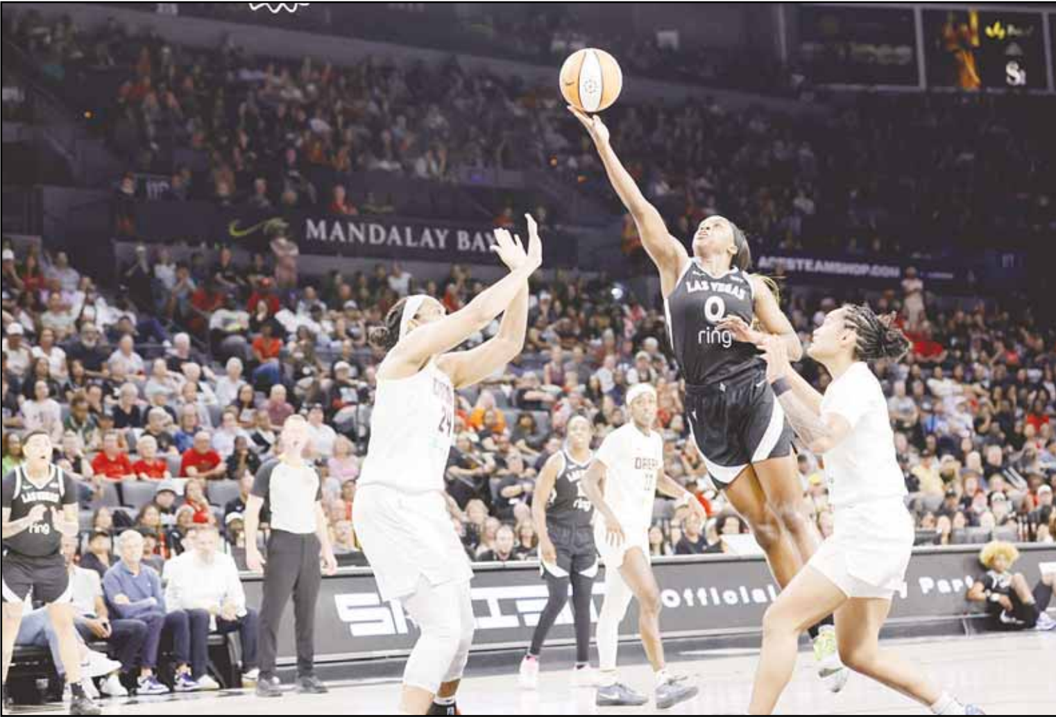
Las Vegas Aces guard Jackie Young (0) shoots a layup between Atlanta Dream forward Brionna Jones (24) and guard Te-Hina Paopao (2) during the first half of a WNBA basketball game in Las Vegas.