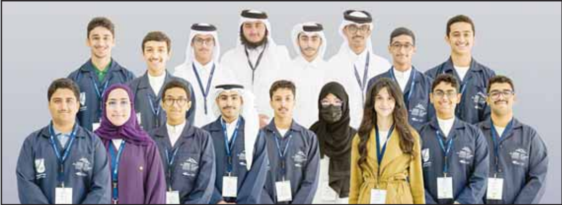
Students from Kuwait, Saudi Arabia, and Qatar explore medicine, engineering, and petroleum programs through workshops and field experiences.