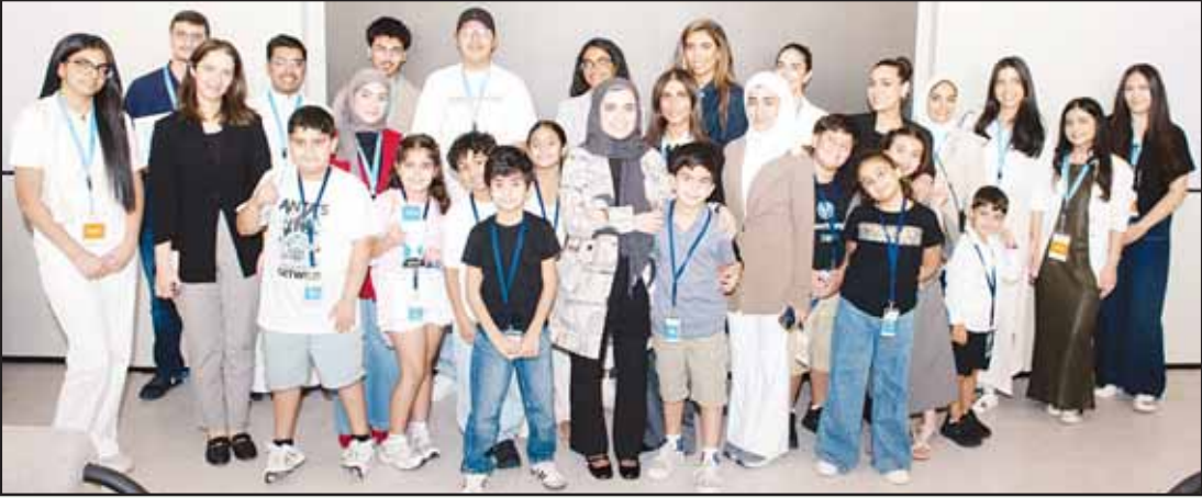
Group photo of the Burgan Bank team with the children.