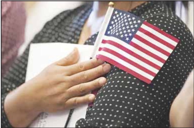
A woman clutches a US flag as she and applicants from other countries prepare to take the oath of citizenship in commemoration of Independence Day during a Naturalization Ceremony in San Antonio on July 3.