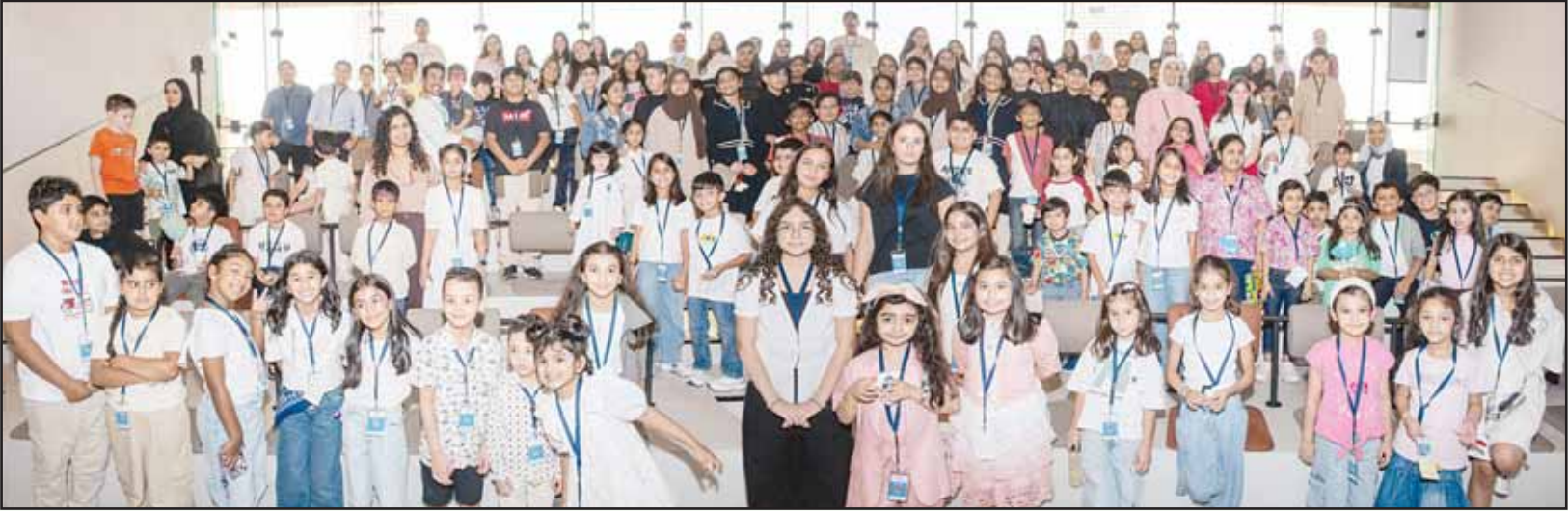
Group photo of the kids at the end of the day.

KUWAIT CITY, Aug 20: As part of its ongoing efforts to foster a positive, people-centered workplace, Burgan Bank hosted a special “Bring Your Kids to Work Day” – a first of its kind initiative for the Bank. The initiative welcomed employees’ children between the ages of 5 and 15 for a day filled with learning, creativity, and hands-on experiences that brought the world of banking to life.