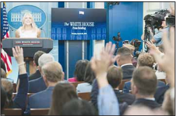
White House Press Secretary Karoline Leavitt speaks with reporters in the James Brady Press Briefing Room at the White House on Aug 19, in Washington.