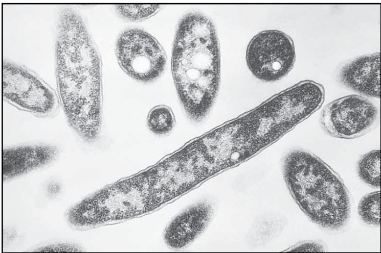
This 1978 electron microscope image made available by the Centers for Disease Control and Prevention shows Legionella pneumophila bacteria which are responsible for causing the pneumonic disease Legionnaires’ disease.

NEW YORK, Aug 20, (Agencies): Health officials have uncovered another death in connection with a Legionnaires’ disease outbreak in New York City, health officials said. The outbreak in Central Harlem has sickened dozens since it began in late July and the latest death was announced late Monday night. Officials said they had concluded the death of a person with the disease who died before mid-August is associated with the cluster, bringing the death toll in the city to five. Fourteen people were hospitalized as of Monday, according to the health department. The bacteria that causes Legionnaires’ disease had been discovered in 12 cooling towers on 10 buildings, including a city-run hospital and sexual health clinic, health officials said. Remediation efforts have since been completed on all of the cooling towers. Legionnaires’ disease is a type of