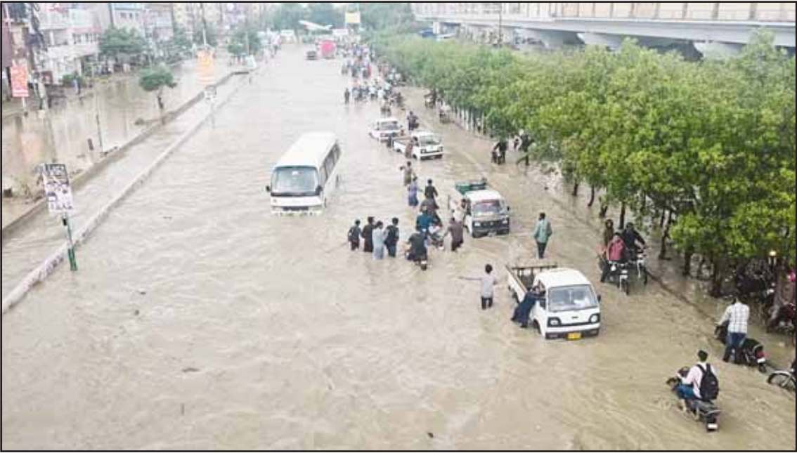
Drivers push their vehicles through a flooded road after heavy rainfall in Karachi, Pakistan on Aug 19.

The case against Uribe dates back to 2012, when he filed a libel suit against Ivan Cepeda, a left-wing legislator who had gathered statements from former members of paramilitary groups accusing Uribe of being one of the founders of Bloque Metro, a paramilitary group that defended cattle ranchers from attacks by rebel groups.