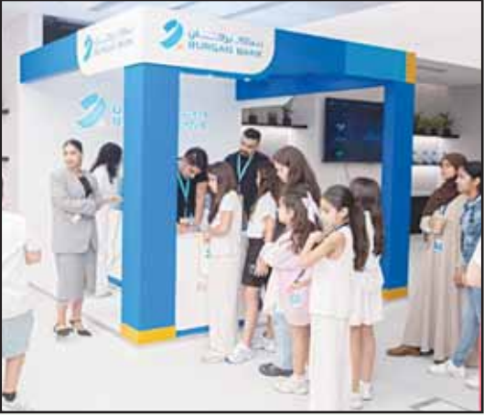
The Junior Banker of the day experience.