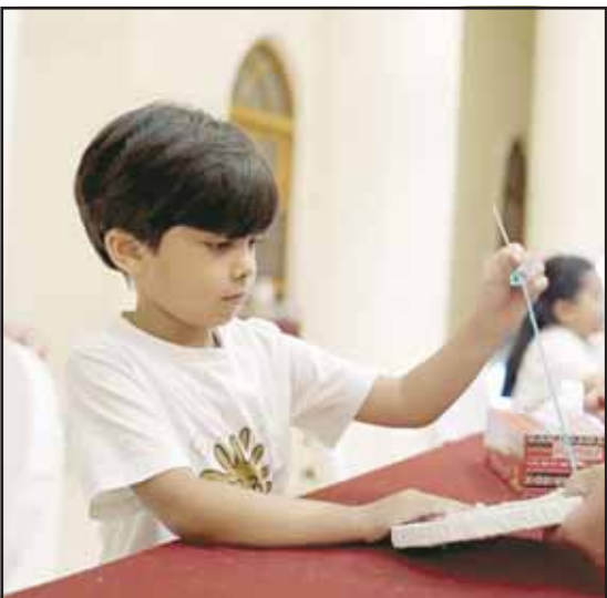
KFH’s Fun with Weaving program.

KUWAIT CITY, Aug 20: Kuwait Finance House (KFH) organized a program, in cooperation with Sadu House, for Baiti account customers. Titled “Fun with Weaving”, the program aims to encourage children to protect the environment by working with fully recycled materials in line with Keep it Green initiative. Fun with Weaving reflects KFH’s ongoing efforts to sponsor diverse cultural activities, aiming to preserve national heritage and reinforce the Bank’s commitment to social responsibility and sustainability. The strategic partnership between KFH and Sadu House contributes to enhancing Sadu House’s educational and cultural endeavors, especially those initiatives focused on promoting traditional weaving as a pillar of Kuwaiti heritage. Through practical training, children are trained the traditional handicrafts, strengthening their connection to national identity, and introducing them to Kuwait’s unique textile heritage, most notably Sadu weaving. Moreover, this program helps nurture their talents and stimulate creative thinking. It also instills in them an appreciation for tradition-