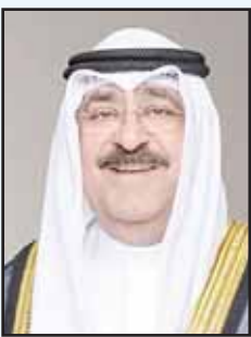
HH the Amir