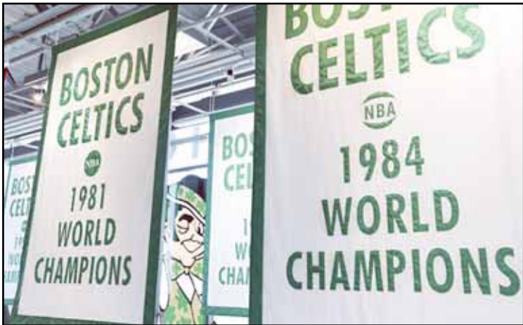
In this file photo, Lucky the Leprechaun, the Boston Celtics team logo, peers out from in between Celtics championship banners hanging in their new basketball team practice facility in Boston.