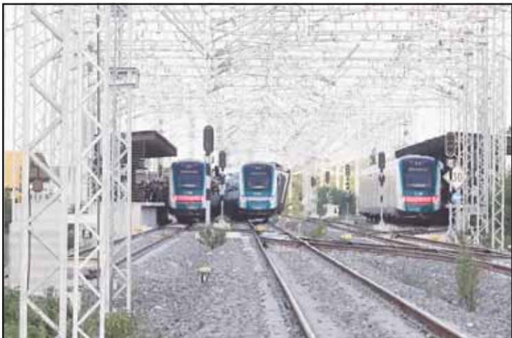
A Maya Train car, (center), sits derailed at a station in Izamal, Yucatan state, Mexico on Aug 19.

The train was running from the Caribbean resort of Cancun to the Yucatan