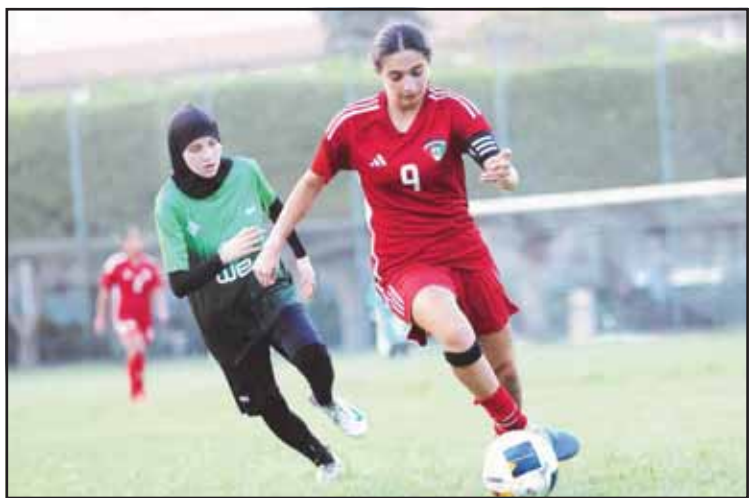
Players fighting for the ball.

CAIRO, Aug 20: Kuwait's U-17 girl's team lost 2-0 to Egypt's Al-Jazira Club in its first friendly match, part of its training camp currently underway in Cairo.