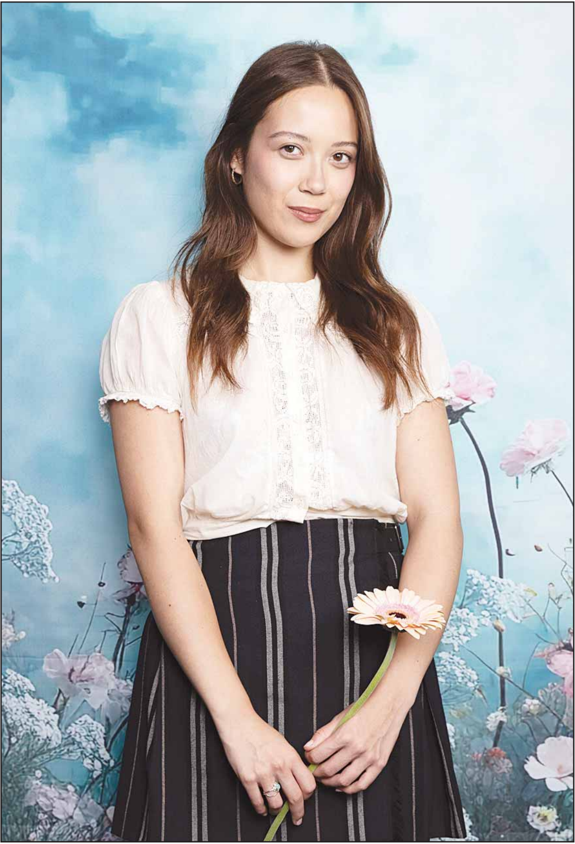
Laufey poses for a portrait on July 24, 2025, in Los Angeles.

Laufey: For sure. I think I was never allowed to embrace anger. I was a very good kid growing up. I was very polite and very quiet. I used this as a way to show that you can be angry, and rather, to show