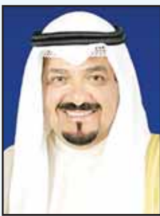
HH the Prime Minister