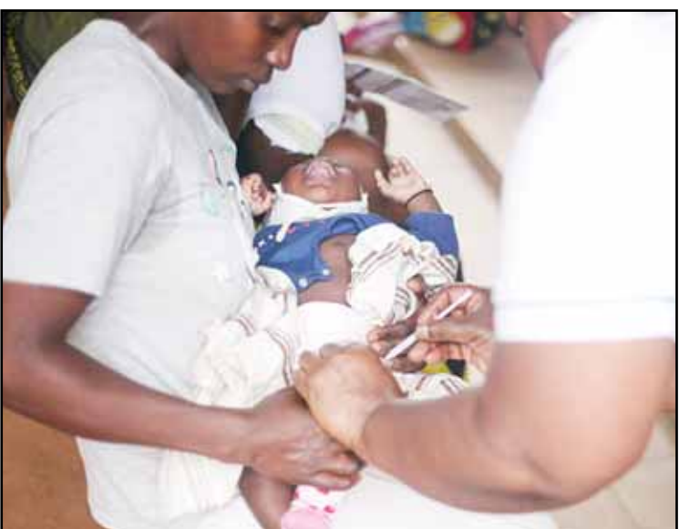
A child receives a vaccine shot at Wakiso Health Centre IV in Wakiso, Uganda, July 23, 2025.