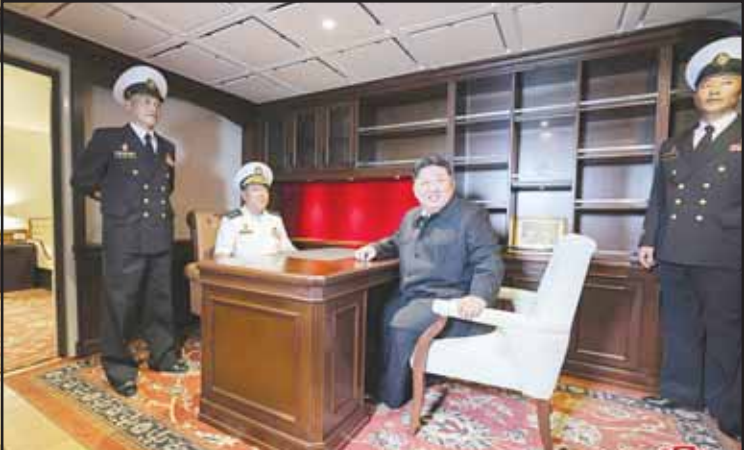
In this photo provided by the North Korean government, North Korean leader Kim Jong Un, (center right), inspects the warship Choe Hyon in Nampo, North Korea on Aug 18.

Once regarded by the North as a useful go-between for extracting conces-