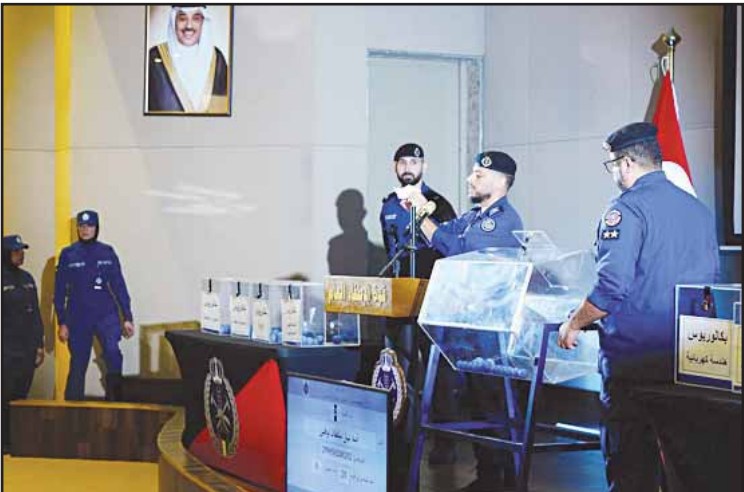
KFF personnel dig out the names of successful candidates.