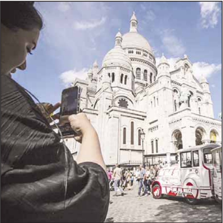
A tourist takes a picture of the Sacre Coeur basilica in the Montmartre district in Paris, France, Monday, Aug. 4.