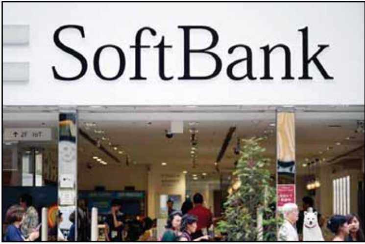
The logo of Japanese mobile provider SoftBank is seen at its shop in Tokyo on June 14, 2018.

The U.S. government’s negotiations to become a major Intel shareholder are coming on a heels of a $2 billion investment Japanese technology giant SoftBank Group disclosed late Monday that it plans to make in the Santa Clara, California, company. Softbank is accumulating its 2% stake in Intel at $23 per share - a slight discount from the stock’s price