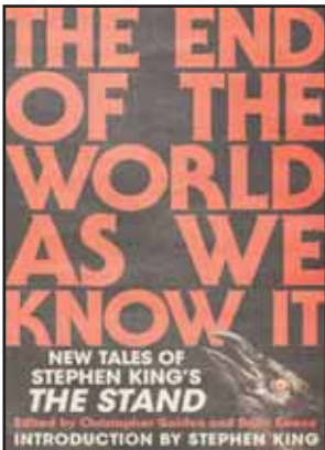
This cover image released by Simon & Schuster shows “The End of the World as We Know It: New Tales of Stephen King’s The Stand.”

One I particularly liked was “Grand Junction,” set 30 years after the end of “The Stand” as a thriving community in the Colorado title town begins to feel threatened by stories of bad things happening in nearby Telluride. “The seasons, the rain and snow and sun, day and night and back into day, the feelings in our heart chasing each other - it’s all a cycle,” writes Chuck Wendig, expanding on the “Life is a Wheel” theme King refers to often in his writing. “And good and evil are on that cycle... Righteousness rules. And then the wheel turns on its axis. Goodness softens. Weakens... Evil gathers at the edges. Just outside the firelight, waiting for its chance.”