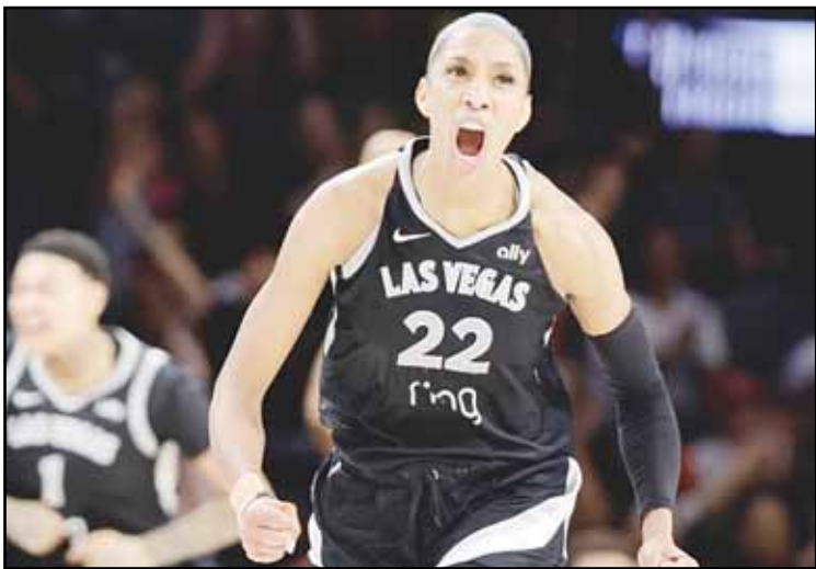
Las Vegas Aces center A'ja Wilson (22) celebrates after making a basket against the Atlanta Dream during the second half of a WNBA basketball game in Las Vegas.

seven-game absence due to a back injury, and Ariel Atkins scored 19 points apiece for Chicago and Kia Nurse added 13. Kamilla Cardoso had 10 points, six rebounds, six assists and three blocks and Elizabeth Williams added 10 points and nine rebounds.