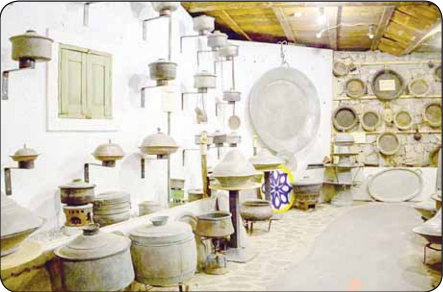
Old household utensils