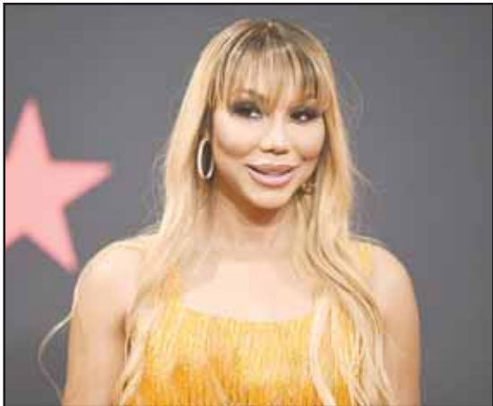
Tamar Braxton arrives at the BET Awards on June 26, 2022, at the Microsoft Theater in Los Angeles.

They and other family members appeared on the reality series “Braxton Family Values” starting in 2011, and Tamar Braxton has since appeared in spin-offs