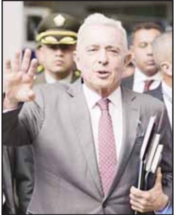
Colombia’s former president Alvaro Uribe leaves court after a hearing in his trial over witness tampering and bribery charges in Bogota, Colombia on Feb 10.

The Superior Tribunal said Tuesday it approved an injunction filed by Uribe’s defense team seeking his release from house arrest. Uribe’s lawyers argued his right to due process was violated by the arrest order against