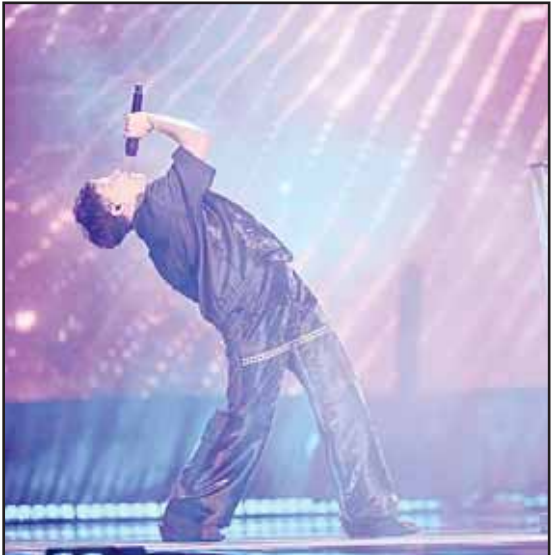
Winner of the Eurovision Song Contest JJ from Austria performs the winning song “Wasted Love” during the Grand Final of the 69th Eurovision Song Contest, in Basel, Switzerland, early Sunday, May 18, 2025.

The last Eurovision song contest, which has been uniting and dividing Europeans since 1956, was watched by 160 million viewers.