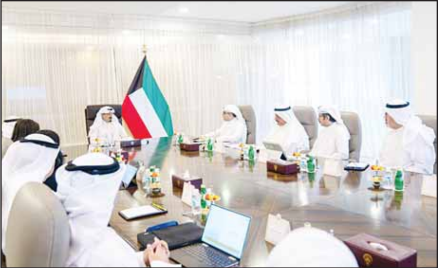
PM Diwan photos

Left: HH the PM chairs meeting on housing plans, infrastructure development. Right: HH the PM chairs meeting on waste tires, public cleaning contracts.