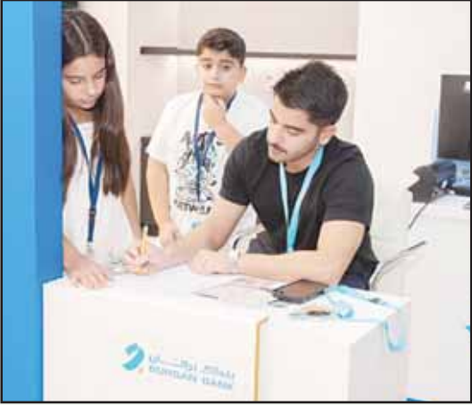
The Junior Banker of the day experience.