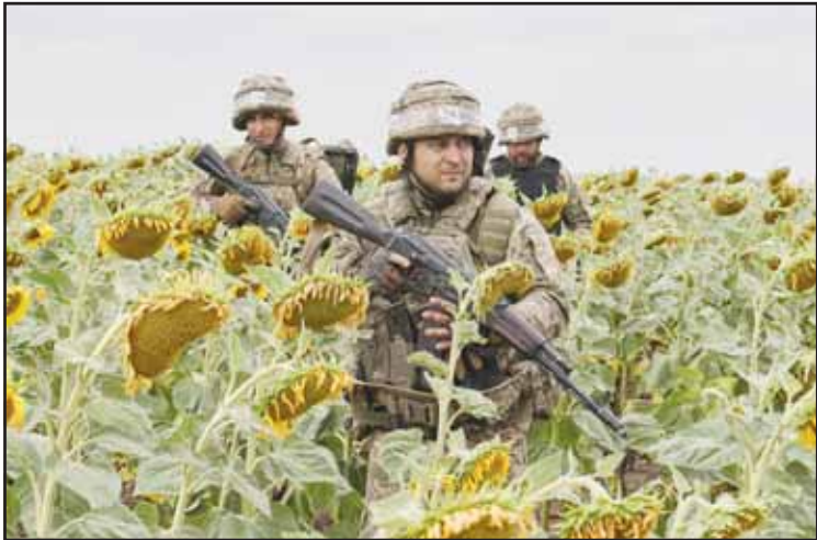
In this photo provided by Ukraine’s 65th Mechanized Brigade press service, recruits practice military skills on a training ground on a sunflower field in the Zaporizhzhia region, Ukraine on Aug 11.

BRUSSELS, Aug 20, NATO defense chiefs were due to hold a virtual meeting Wednesday, a senior alliance official said, as countries pushing for an end to Russia’s war on Ukraine devise possible future security guarantees for Kyiv that could help forge a peace agreement. Italian Admiral Giuseppe Cavo Dragone, chair of NATO’s Military Committee, said that 32 defense chiefs from across the alliance would hold a video conference as a U.S.-led diplomatic push seeks to end the fighting. US Gen Alexis Grynkewich, NATO’s supreme allied commander Europe, will take part in the talks, Dragone said on social platform X. US President Donald Trump met last Friday with Russian President Vladimir Putin in Alaska and on Monday hosted Ukrainian President Volodymyr Zelenskyy and prominent European leaders at the White House. Neither meeting delivered concrete progress. Trump is trying to steer Putin and Zelenskyy toward a settlement more than three years after Russia invaded its neighbor, but there are major obstacles. They include Ukraine’s demands for Western-backed military assurances to ensure Russia won’t mount another invasion in coming years. “We need strong security guarantees to ensure a truly secure and lasting peace,” Zelenskyy said in a Telegram post Wednesday after Russian missile and drone strikes hit six regions of Ukraine overnight. Kyiv’s European allies are looking to set up a force that could backstop any peace agreement, and a coalition