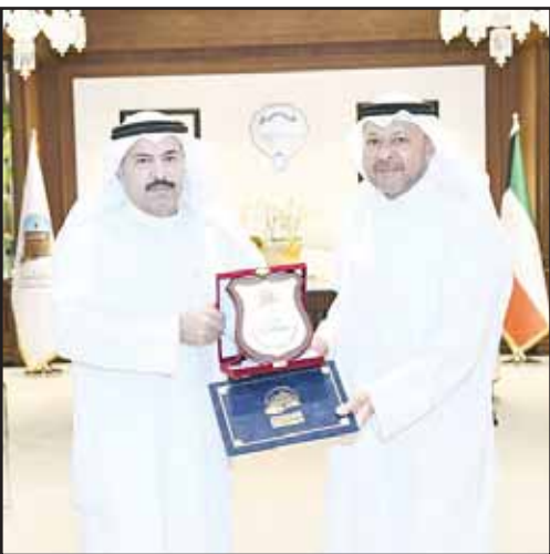
Former security officials receive recognition for enhancing safety in Farwaniya.