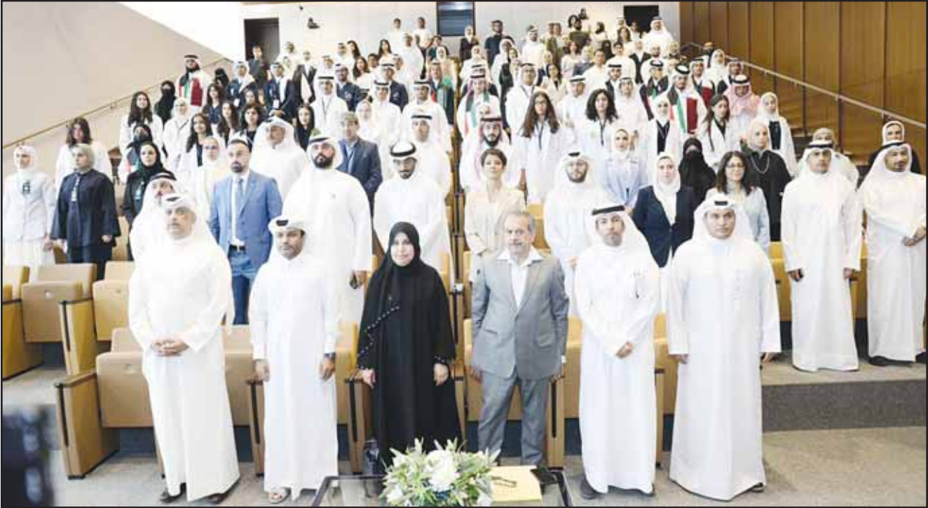
Kuwait University photos

The medical program included a range of basic medical subjects, such as health sciences, Anatomy, Pharmacology, General Surgery and other important medical fields. These subjects were presented through scientific lectures and interactive workshops aimed at introducing students to medical careers and their future opportunities.