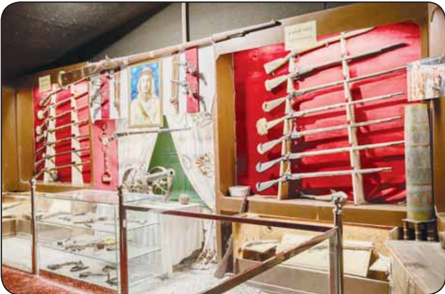
Old weapons room