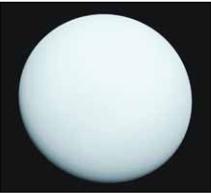
This is an image provided by NASA showing the planet Uranus, taken by the spacecraft Voyager 2 in 1986.