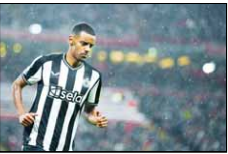
Newcastle's Alexander Isak celebrates after scoring his side's opening goal during the English Premier League soccer match between Liverpool and Newcastle, at Anfield stadium in Liverpool, England.

NEWCASTLE, England, Aug 20, Alexander Isak has gone public for the first time about his discontent at Newcastle, saying the club has broken promises and that “the relationship can’t continue.” The Sweden striker was the subject of a bid from Liverpool during the offseason and has been training away from the Newcastle squad, having indicated he wanted to explore his options. Isak was not involved in Newcastle’s Premier League opener on Saturday, a goalless draw at Aston Villa. On Tuesday, the 25-year-old Isak, who scored 27 goals in 42 games for the Magpies last season, was named in the PFA team of the season for the Premier League and used a social media post expressing his gratitude to address his situation at Newcastle for the first time. “I’ve kept quiet for a long time while others have spoken,” Isak wrote. “That silence has allowed people to push their own version of events, even though they know it doesn’t reflect what was really said and agreed behind closed doors. “The reality is that promises were made and the club has known my position for a long time. To act now as if these issues are only emerging is misleading. When promises are broken and trust is