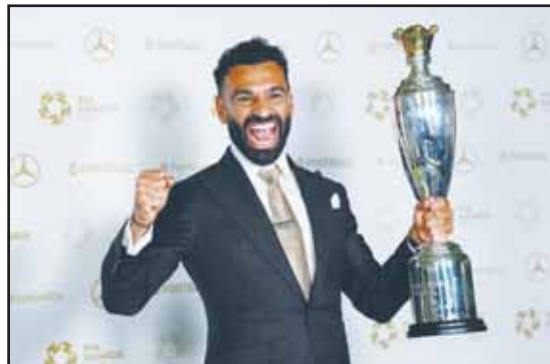
Liverpool's Mohamed Salah poses with his Player of the Year Award at the PFA Awards 2025 at Manchester Opera House in Manchester, England.

Caldentey, 29, enjoyed a remarkable debut campaign in north London after arriving from Barcelona, scoring 19 goals in 41 appearances across all competitions. That included nine goals and five assists in the Women's Super League, where she was also named Player of the Year by fans in May.