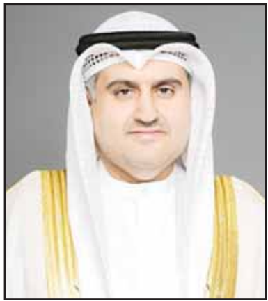
Minister of Justice Nasser Al-Sumait

KUWAIT CITY, Aug 17: Minister of Justice Nasser Al-Sumait issued a decision on Sunday to form a specialized committee tasked with reviewing and updating the legislative system governing rental issues and establishing a new legal framework to regulate property owners' unions. The committee will also study related provisions in the civil and commercial laws, reports Al-Seyassah daily.