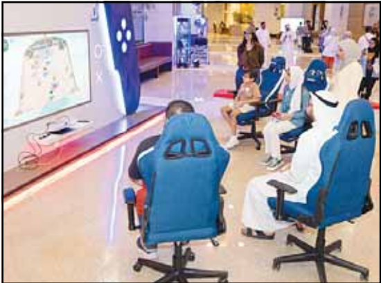
During the participants' break.