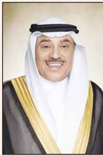
HH the Crown Prince