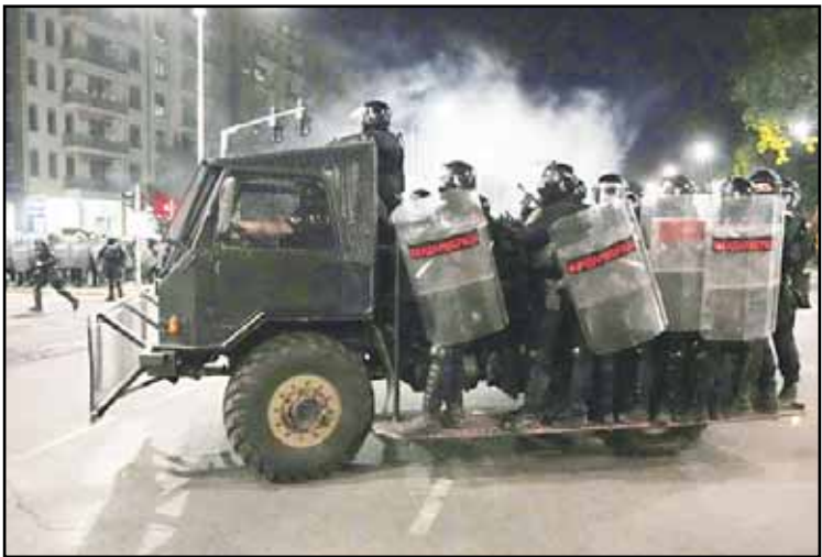
Serbian gendarmerie officers patrol in truck after clearing people blocking a street during an anti-government protest in Belgrade, Serbia on Aug 16. (AP)

BELGRADE, Serbia, Aug 17, (AP): Angry protesters clashed with police in a town in western Serbia and in the capital Belgrade on Saturday as tensions soared further in the Balkan nation following days of violent demonstrations. Wearing scarves over their faces and chanting slogans against President Aleksandar Vucic, a group of young men threw flares at his Serbian Progressive Party offices in Valjevo, some 100 kilometers (60 miles) from the capital Belgrade. They set fire to the party’s offices before clashing with riot police in a downtown area. Police threw multiple rounds of tear gas and charged at the demonstrators who hurled bottles, rocks and flares at them. Similar clashes also erupted on Saturday evening in the northern city of Novi Sad and in Belgrade, with police directing tear gas at protesters while battling the protesters who set garbage containers on fire. The protesters in Valjevo turned out to the streets to protest what they allege is police brutality. Interior Minister Ivica Dacic said at least one policeman was injured in Valjevo and 18 people detained so far. “There will be more detentions. All those who have broken the law will be arrested,” Dacic said. He said that the seat of the Valjevo court, prosecutor’s office and the municipal building also have been demolished.