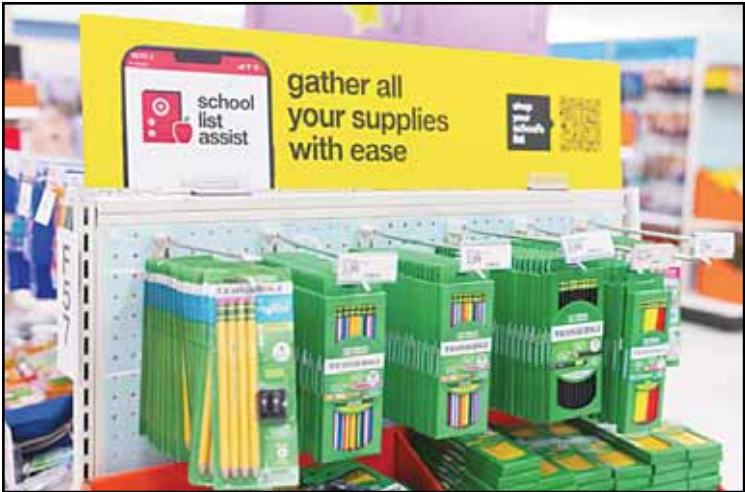
Information on a school list assist and a QR code is displayed above pencils for sale in the back-to-school supplies section of a Target in Sherwood, Ore., Friday, Aug. 8, 2025.