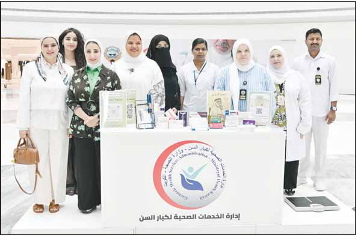
A photo from the Ministry of Health’s awareness campaign on the risks of multiple medications, launched under the slogan ‘Health through Balanced Medication.’

KUWAIT, Aug 17, (KUNA): Ministry of Health, represented by the Elderly Health Services Department, launched on Sunday an awareness campaign on the risks of polypharmacy. The campaign, running from August 17 to 21, aims to raise awareness among the elderly and their caregivers on the importance of safe and balanced medication use. Events are being held across several venues, starting today at Al-Assima Mall from 10:00 am to 10:00 pm local-time, Monday at the Al-Oyon Polyclinic from 09:00 am to 12:00 pm, Tuesday at Jabriya Health Center from 09:00 am to 12:00 pm. Activities will proceed Wednesday at Bayan Health Center and conclude on Thursday at Jaber Al-Ahmad Hospital from 09:00 am to 12:00 pm. The initiative is part of the ministry’s efforts to enhance community awareness on the dangers of multiple medication use, especially among seniors, and to encourage them to regularly review their medications with experts.