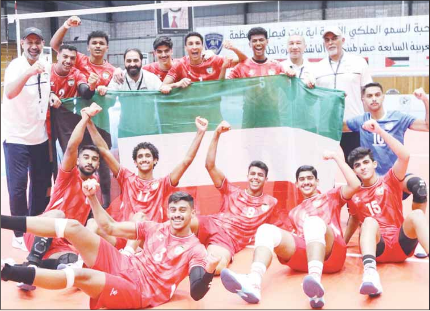
Kuwait players celebrate victory over Palestine.

By Khaled Al-Enezi Al-Seyassah/Arab Times Staff