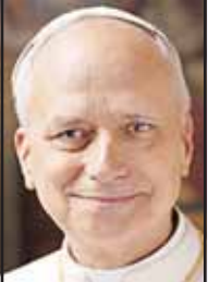
Pope Leo XIV

Pope celebrates Mass for homeless people: Pope Leo XIV spent the last Sunday of his summer vacation with several dozen homeless and poor people and the church volunteers who help them, celebrating a special Mass for them and inviting them into the Vatican’s lakeside estate for a lunch. Leo celebrated Mass in the St Mary sanctuary of Albano, near the papal summer retreat in Castel Gandolfo where he is vacationing. The Mass was attended by around 110 people cared for by the local Caritas church charity, and the volunteers who run the diocese’s shelters, clinics and social service offices. In his homily, Leo celebrated the “fire of charity” that had brought them together. “And I encourage you not to distinguish between those who assist and those who are assisted, between those who seem to give and those who seem to receive, between those who appear poor and those who feel they have something to offer in terms of time, skills, and help,” he said. In the church, he said, everyone is poor and precious, and all share the same dignity. Leo, the former Robert Prevost, spent most of his adult life working with the poor people of Peru, first as an Augustinian missionary and then as bishop. Former parishioners and church workers say he greatly reinforced the work of the local Caritas charity, opening soup kitchens and shelters for migrants and rallying funds to build oxygen plants during the COVID-19 pandemic. (AP)