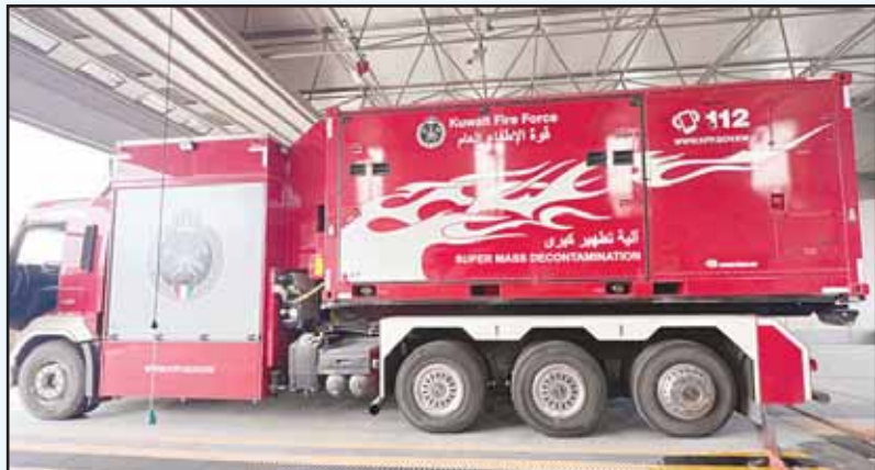
The decontamination unit.