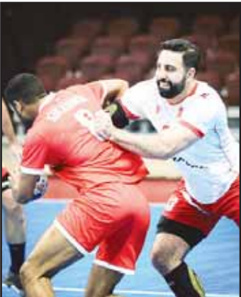
Kuwait Club, Al-Sulaibikhat players prepare for the championship.