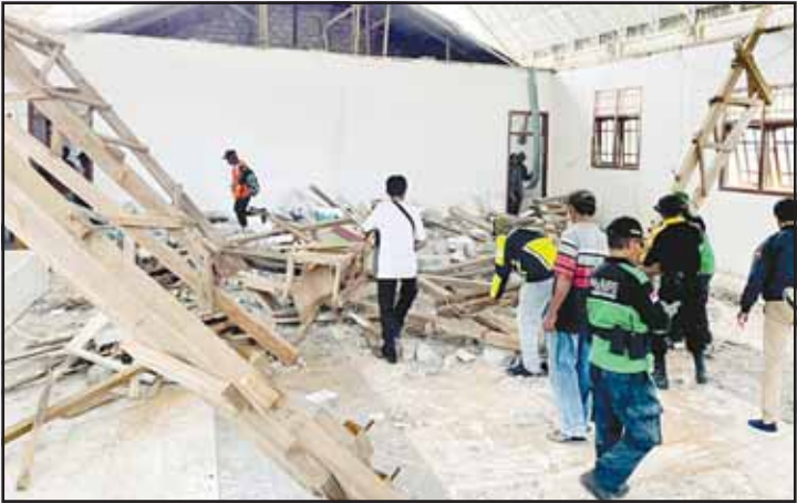
This photo taken with a mobile phone provided by Regional Disaster Management Agency (BPBD) Central Sulawesi shows officers inspecting a damaged building after an earthquake in Poso Regency, Central Sulawesi, Indonesia, on Aug 17. (Xinhua)

Flash flood in north China leaves 8 dead, 4 missing: A flash flood swept through a wild camping site in north China's Inner Mongolia Autonomous Region late Saturday, killing eight people and leaving four others missing, local authorities reported on Sunday. The disaster struck around 10 p.m. Saturday in the upstream area of a river in Urad Rear Banner in Bayannur City, leaving 13 campers unaccounted for, according to the banner's publicity department. By 10 a.m. Sunday, one person had been rescued, eight were confirmed dead, and four remained missing. Search and rescue operations are currently underway. (Xinhua)