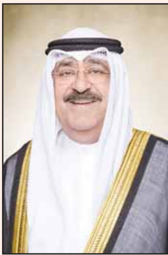
HH the Amir