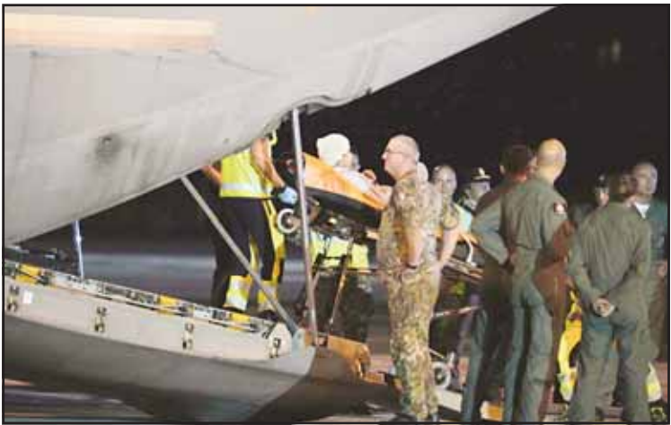
Palestinian children and their families evacuated from Gaza arrive at Rome’s Ciampino military airport, Thursday, Aug. 14.