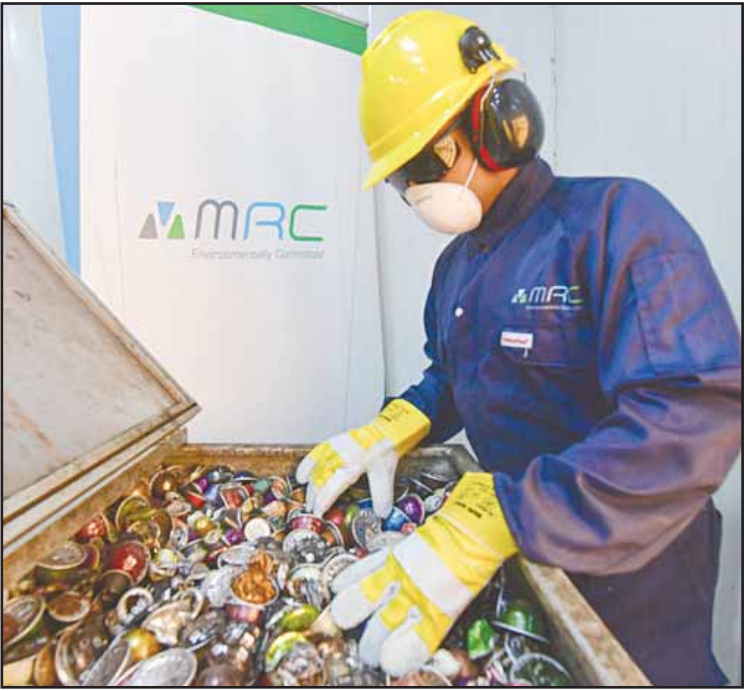
Part of the factory operations.