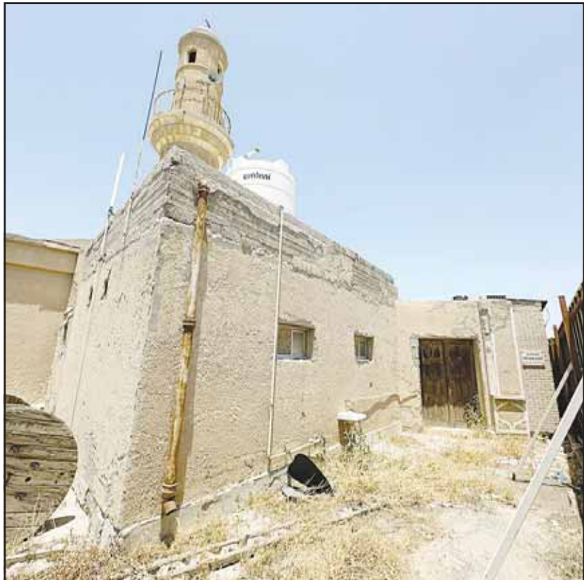
File photo: The mosque is located in Kuwait City and was built in 1915. It's situated in the area behind Dickson House.

In the Gulf, the UAE leads the field, offering a wide variety of natural attractions that draw tourists from around the world. The country features 128 diverse environmental sites and boasts of breathtaking landscapes and varied terrains — from stunning deserts with dunes and oases to mountain ranges, valleys, beaches, mangrove forests and open plains.