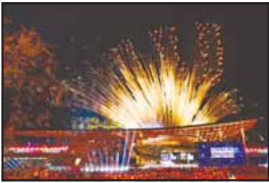
Fireworks are seen during the closing ceremony of the World Games 2025 in Chengdu, southwest China's Sichuan Province.