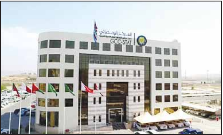
GCC Statistical Center.

MUSCAT, Aug 17, (KUNA): The gross domestic product (GDP) of the Gulf Cooperation Council (GCC) countries at current prices reached USD 2.143 trillion in 2023, down 2.7 percent from USD 2.202 trillion at the end of 2022.