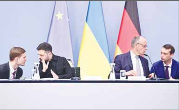
Ukrainian President Volodymyr Zelenskyy, (second left), and German Chancellor Friedrich Merz, (second right), attend a video meeting of European leaders with US President Donald Trump on the Ukraine war in Berlin, Germany on Aug 13, ahead of the summit between the US and Russian leaders.

NEW YORK, Aug 17, Special US envoy Steve Witkoff said Sunday that Russian leader Vladimir Putin agreed at his summit with US President Donald Trump to allow the US and European allies to offer Ukraine a security guarantee resembling NATO’s collective defense mandate as part of an eventual deal to end the 3 1/2-year war. “We were able to win the following concession: That the United States could offer Article 5-like protection, which is one of the real reasons why Ukraine wants to be in NATO,” he said on CNN’s “State of the Union.” He added that it “was the first time we had ever heard the Russians agree to that.” European Commission President Ursula von der Leyen, speaking at a news conference in Brussels with Ukrainian President Volodymyr Zelenskyy, said that “we welcome President Trump’s willingness to contribute to Article 5-like security guarantees for Ukraine and the ‘Coalition of the willing’ -- including the European Union -- is ready to do its share.” Witkoff, offering some of the first details of what was discussed at Friday’s summit in Alaska, said the two sides agreeing to “robust security guarantees that I would describe as game-changing.” He added that Russia said that it would make a legislative commitment not to go after any additional territory in Ukraine. Zelenskyy thanked the United States for recent signals that Washington is willing to support security guarantees for Ukraine, but said the details re