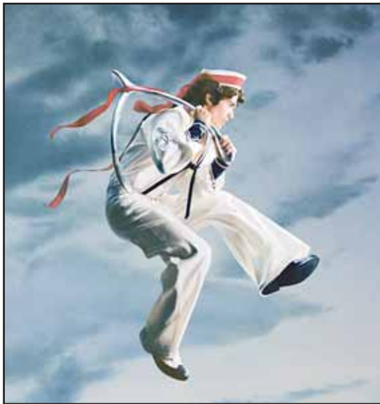
This album cover image released by Republic Records shows ‘Wishbone’ by Conan Gray.

“Everything comes back around, I still feel like the class clown,” he lolls. While Gray struggles with his place, the way he deftly tackles those feelings in song proves he’s among the star pupils of his class.