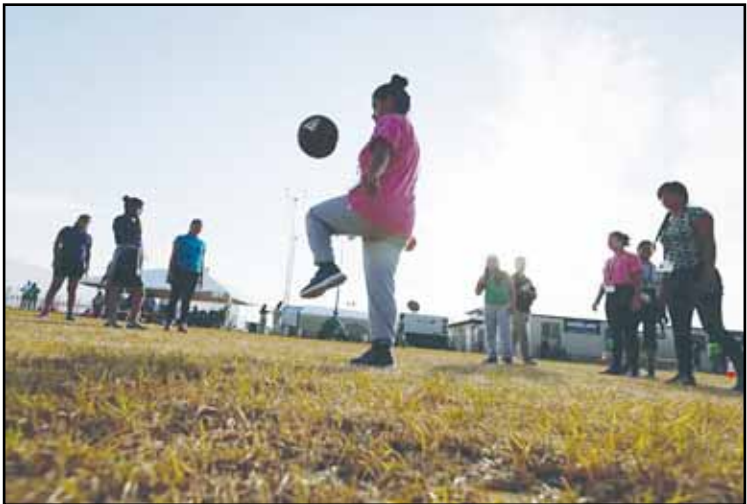
Immigrants play soccer at a new US government holding center for migrant children in Carrizo Springs, Texas, July 9, 2019.