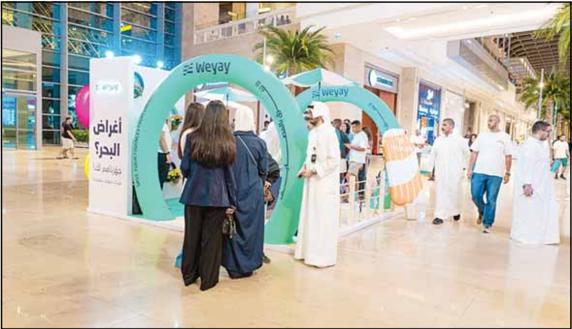
Photos during the event.

App showcases smart savings, budgeting & tracking tools