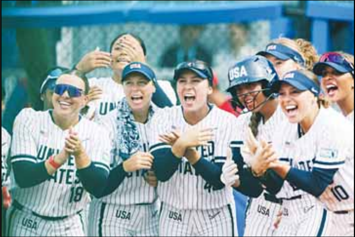
Players of the United States celebrate a home run during the Softball Women’s Finals Gold Medal Game between Chinese Taipei and the United States at the World Games 2025 in Chengdu, southwest China’s Sichuan Province.