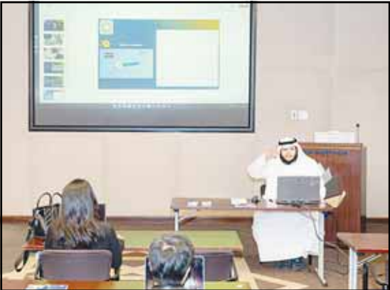
A trainer lectures in his workshop at the camp.