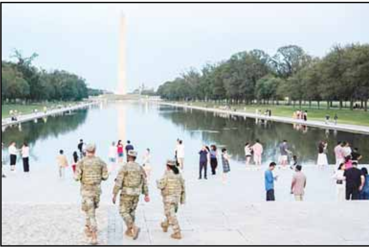
Members of the District of Columbia National Guard patrol along the National Mall on Aug 16, in Washington.

that the president has justified as an emergency response to crime and homelessness, even though city officials have noted that violent crime is lower than it was during Trump’s first term in office. National Guard members have played a limited role in the federal intervention so far, and it’s unclear why additional troops are needed. They have been patrolling at landmarks like the National Mall and Union Station and assisting law enforcement with tasks including crowd control. The Republican governors of the three states said they were sending hundreds of troops at the request of the Trump administration. West Virginia Gov Patrick Morrisey said he directed 300 to 400 Guard troops to head to Washington, adding that the state “is proud to stand with President Trump in his effort to restore pride and beauty to our nation’s capital.” South Carolina Gov Henry McMaster said he authorized the deployment of 200 of his state’s National Guardsmen to help law enforcement in