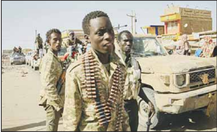
Soldiers arrive to the Allafah market, in an area recently recaptured by Sudan's army from the Rapid Support Forces paramilitary group, in the Al Kalalah district, south of Khartoum, Sudan on Match 27.

CAIRO, Aug 17, A paramilitary fighting against Sudan's military shelled a famine-stricken displacement camp in the western region of Dafur Saturday, killing at least 31 people, including seven children and a pregnant woman, a medical group said, in a second attack on the camp in less than a week. The Rapid Support Forces artillery shelling of the Abu Shouk camp outside el-Fasher, the provincial capital of North Darfur province, also wounded 13 others, the Sudan Doctors Network said in a statement. The Resistance Committees in el-Fasher, a grassroots group tracking the war, said RSF launched an hours-long "extensive artillery shelling" on the camp early Morning. It said in a Facebook post that the attack also resulted in severe damage to private properties and the camp's infrastructure. The RSF didn't immediately respond to a request for comment. The RSF attacked Abu Shouk last week and killed more than 40 people, as the paramilitaries have tried to seize el-Fasher, the military's last stronghold in Darfur.