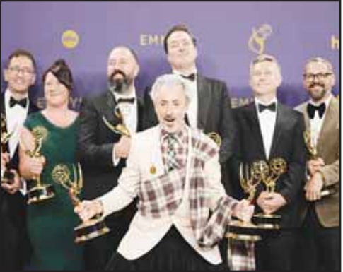
Alan Cumming, (center), and the team from ‘The Traitors’ pose with the award for outstanding reality competition program during the 76th Primetime Emmy Awards, Sept. 15, 2024, at the Peacock Theater in Los Angeles.

LOS ANGELES, Aug 17, The US version of “The Traitors” has brought a group of public figures to a castle in the Scottish Highlands for a game of deceit, with hundreds of thousands of dollars up for grabs. Now, the Emmy award-winning competition will open its doors to everyday people. NBC is now casting for a civilian version of the popular Peacock series, the network announced Thursday. The competition reality series, an American spin-off to its British counterpart, had only cast celebrities for its first three seasons, the last of which aired early this year. The new version will bring a group of everyday people together to play what the host, Alan Cumming, called his “treacherous game” in a video announcing the public casting. Cumming is set to host the new version as well, with production for the show starting in 2026, according to the network. Those who are interested in participating can apply now on the show’s website. The fourth season of the celebrity version is set to launch next year, and a fifth season has already been confirmed. The star-studded cast for season 4