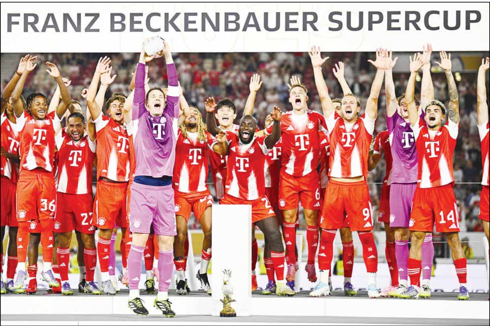
Bayern’s goalkeeper Manuel Neuer celebrates with teammates after winning the German Supercup final soccer match between VfB Stuttgart and Bayern Munich in Stuttgart, Germany.

26 with Bayern playing third-division side Wehen Wiesbaden the following day. Wolfsburg routed fifth-tier SV Hemelingen 9-0 in the first round of the German Cup, and other Bundesliga teams also enjoyed big wins over lower-league opposition. Two-time champion Leipzig