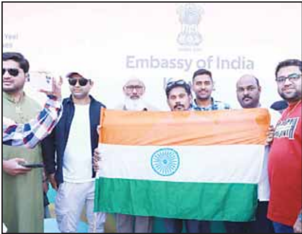
Attendees join the Embassy festivities.