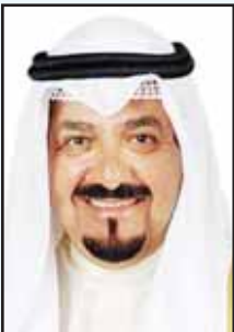
HH the Prime Minister