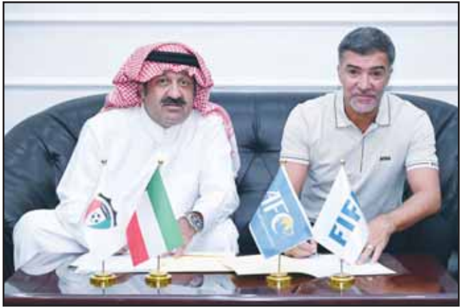
The signing ceremony in progress.