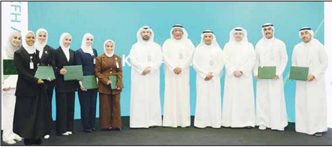
A photo of a group of trainees with Kuwait Finance House officials.