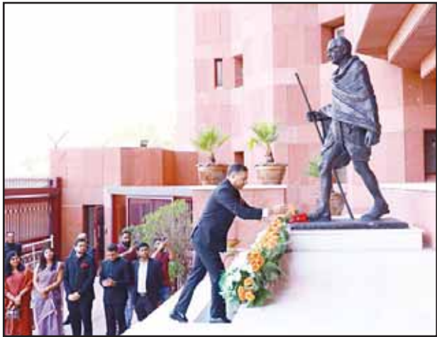
Floral tributes at Gandhi statue.