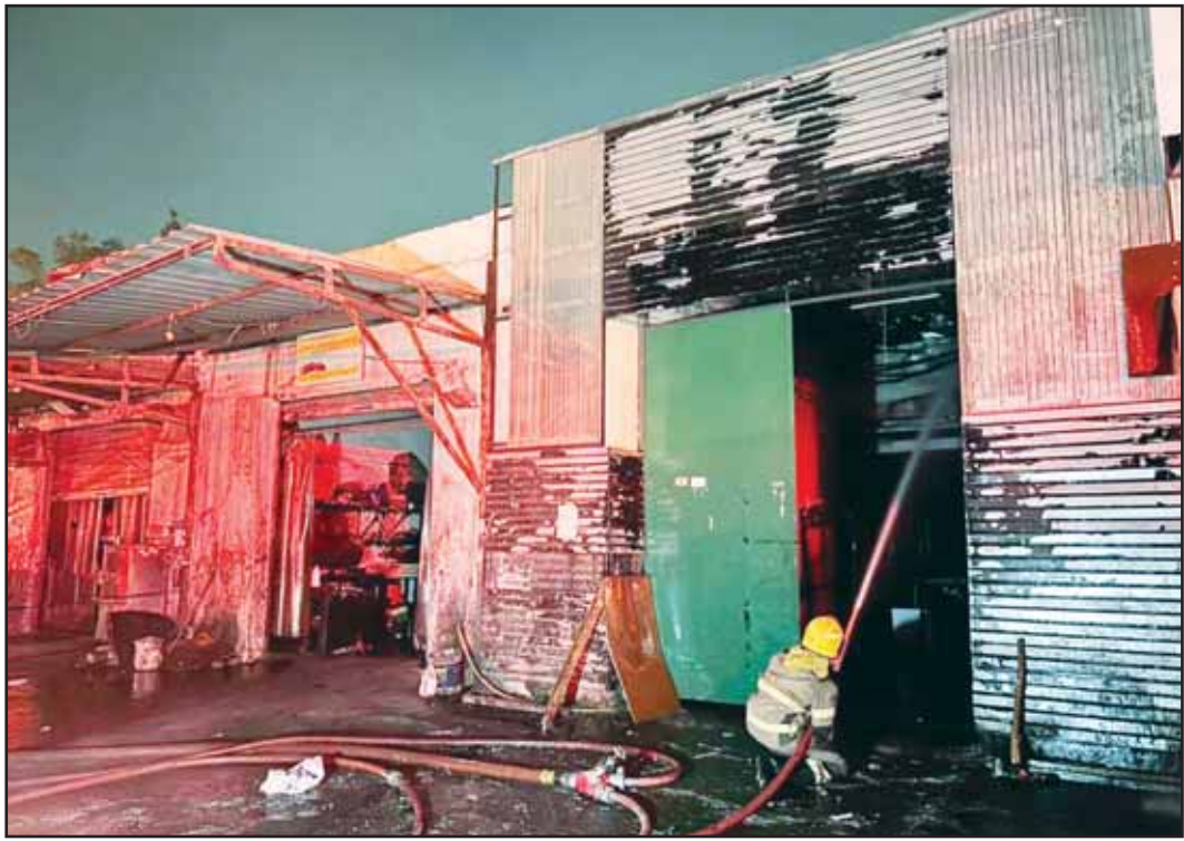
Firefighter in action as KFF contains a metal factory blaze in Shuwaikh.