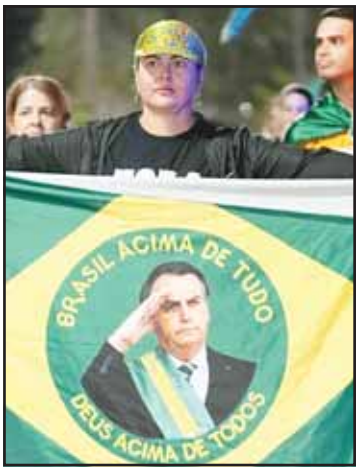
Demonstrators rally in support of former president Jair Bolsonaro at the entrance to his residential complex, to denounce his house arrest order by the Supreme Court, in Brasília, Brazil on Aug 5. (AP) no coup went forward and that Bolsonaro allowed the presidential transition to Lula to take place, undermining any

SAO PAULO, Aug 16, (AP): A verdict and sentence in the coup trial against former Brazilian President Jair Bolsonaro will be delivered early next month, the country’s Supreme Court announced Friday. The court said the five-justice panel that heard the right-wing leader’s case will deliver verdicts and sentences on the five counts against him from Sept. 2 to 12. Bolsonaro, who has drawn the strong support of US President Donald Trump and who remains under house arrest, is accused of leading a conspiracy to stay in office after his narrow election defeat in 2022 to current President Luiz Inácio Lula da Silva. Bolsonaro denies wrongdoing. Prosecutors say Bolsonaro and several of his allies headed a criminal organization that plotted to overturn the election, including plans to kill Lula and Supreme Court Justice Alexandre de Moraes, who is overseeing the criminal case. Prosecutors have presented message exchanges, handwritten notes and other evidence allegedly detailing the plot. Defense attorneys have argued that