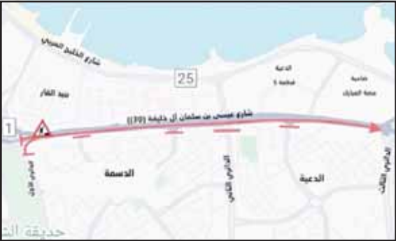
Parts of Road No. 30 to remain closed.

The General Administration of Customs affirmed its commitment to combating all forms of smuggling, enhancing inspection and detection mechanisms, and taking firm action against anyone attempting to smuggle contraband.