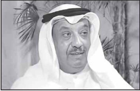
The late Ahmed Yousef Al-Nafisi

Regarding the joint Wafra field, sources indicated that its capacity reached 155,000 barrels of oil per day at the end of the fiscal year ending March 31; down from a previous level of around 170,000 barrels per day. They pointed out that exploration efforts are ongoing at full capacity in the Wafra field to enhance its production potential, especially since the Wafra Joint Operations discovered new reservoirs yielding 200 to 380 barrels per day per well. It is worth mentioning that Kuwait and Saudi Arabia announced in May the discovery of a new oil field in the divided zone – five kilometers north of the Wafra field. This is the first such discovery since the resumption of Kuwaiti-Saudi joint production operations in the divided zone and the adjacent offshore area in mid-2020.