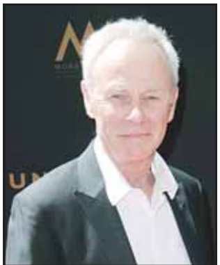
Tristan Rogers arrives at the 43rd annual Daytime Emmy Awards at the Westin Bonaventure Hotel on Sunday, May 1, 2016, in Los Angeles.

Rogers and Samms left the show together in November 2024 in scenes taped with a nod to “Casablanca.” He returned to the show in July for one episode when Sasha arrived to his home in France with her new baby. It was then revealed that Rogers had lung cancer