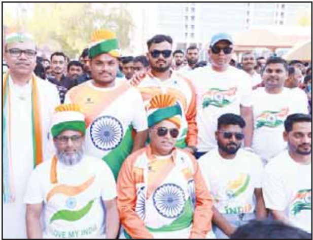
Indian community members at the event.