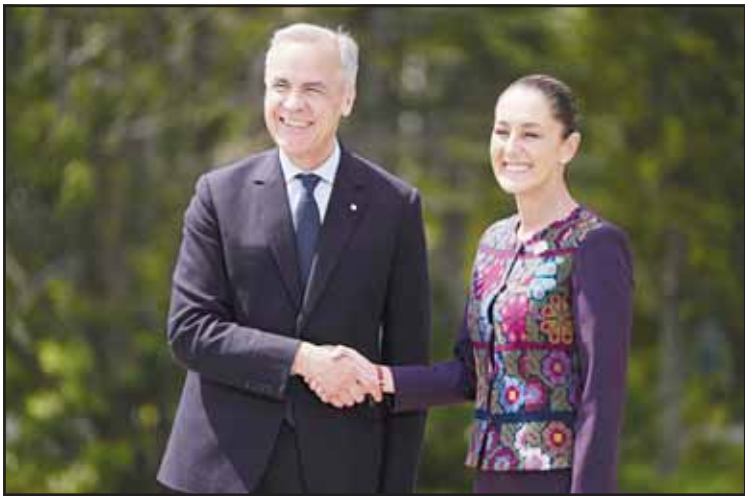
Canada’s Prime Minister Mark Carney welcomes Mexican President Claudia Sheinbaum to the G7 Summit in Kananaskis, Alberta on June 17. cluded from the US tariffs. But Trump has some sector-specific tariffs, known as 232 tariffs, that are having an impact. There is a 50% tariff on steel and aluminum imports and a 25% tariff on auto imports. Mexico is Canada’s third largest trading partner after the US and China. Canada was Mexico’s fifth-largest trading partner in 2024.

TORONTO, Aug 16, Canadian Prime Minister Mark Carney will visit Mexico in September to meet with Mexican President Claudia Sheinbaum, a senior official familiar with the matter said Friday. The meeting comes as America’s neighbors deal with US tariffs and prepare for a review of the free trade deal between the three countries next year. The official confirmed the visit on condition of anonymity as they were not authorized to speak publicly on the matter. Carney sent his foreign minister as well as his finance minister to meet with Sheinbaum earlier this month in a bid to diversify trade. They also met a large group of Canadian and Mexican business leaders, including key players supporting North America’s integrated economy, trade infrastructure and supply chains. Sheinbaum visited Canada during the G7 summit in Alberta in June. Goods that comply with the 2020 United States-Mexico-Canada Agreement that US President Donald Trump negotiated during his first term are ex