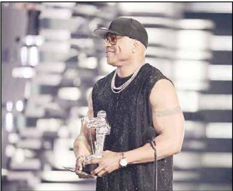
LL Cool J presents the award for video of the year during the MTV Video Music Awards, Sept. 12, 2023, at the Prudential Center in Newark, N.J.

with 10 nominations, ROSÉ and Sabrina Carpenter with eight each, Ariana Grande and The Weeknd with seven each and Billie Eilish with six. Charli XCX also received love with five nominations for her “Brat” Summer success “Guess,” featuring Eilish. Bad Bunny, Doechii, Ed Sheeran, Jelly Roll, Miley Cyrus and Tate McRae have four nominations each. Fan voting across the 19 categories is live now on the VMAs website. Voting closes on Sept. 5 at 6 p.m. Eastern, except for the best new artist category, which will accept votes into the live show. The public can vote up to 10 times a day until voting closes. Performers, presenters, special guests and the recipient of the Video Vanguard Award have not been announced yet. The Video Vanguard Award was given to Katy Perry last year. Previous recipients include Shakira, Beyoncé, Nicki Minaj and Madonna.