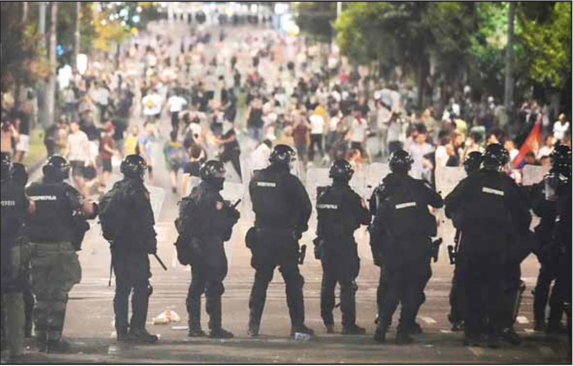
Serbian gendarmierie officers guard the street during an anti-government protest near Serbian Progressive Party office in Belgrade, Serbia on Aug 14.

Zelenskyy voiced support for Trump’s proposal for a trilateral meeting with the U.S. and Russia. He said that “key issues can be discussed at the level of leaders, and a trilateral format is suitable for this.” But Putin’s foreign affairs adviser, Yuri Ushakov, said on Russian state television Saturday that a potential meeting of Trump, Putin and Zelenskyy has not been raised in U.S.-Russia discussions. “The topic has not been touched upon yet,” he said, according to Russian state news agency RIA Novosti. Zelenskyy wrote on X that he told Trump that “sanctions should be strengthened if there is no trilateral meeting or if Russia tries to evade an honest end to the war.” Russian officials and media struck a largely positive tone, with some describing Friday’s meeting as a symbolic end to Putin’s isolation in the West. Former President Dmitry Medvedev, deputy head of Russia’s Security Council, praised the summit as a breakthrough in restoring high-level dialogue between Moscow and Washington, describing the talks as “calm, without ultimatums and threats.” Russian attacks on Ukraine continued overnight, using one ballistic missile and 85 Shahed drones, 61 of which were shot down, Ukraine’s air force said. Front-line areas of Sumy, Dnipropetrovsk, Donetsk and Chernihiv were attacked.