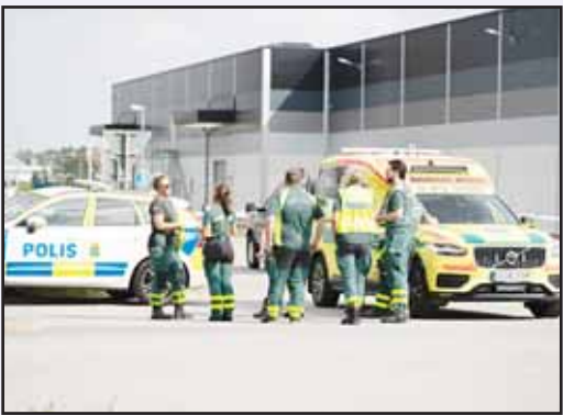
Police on scene outside a mosque after a shooting in Orebro, Sweden on Aug 15.

☐ ☐ ☐ 11 dead in western Russia factory fire: A fire at an industrial facility in western Russia’s Ryazan region killed 11 people and injured 130 others, the Russian Ministry of Emergency Situations said on Saturday. “The bodies of two more people were found during rubble clearing. In total, unfortunately, 11 people died and 130 people were injured,” the ministry reported on its Telegram channel. Earlier, a person, whose location was detected by one of the canine units deployed as part of the air-mobile group, was rescued from the debris, the ministry said. More than 360 specialists and 90 units of equipment have been deployed to the scene, while search and rescue operations continue at the incident site, it added. The fire broke out at around 10:30 a.m. local time