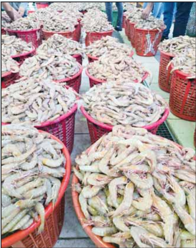
Local shrimp showcased at a Kuwaiti market, ready for consumers.