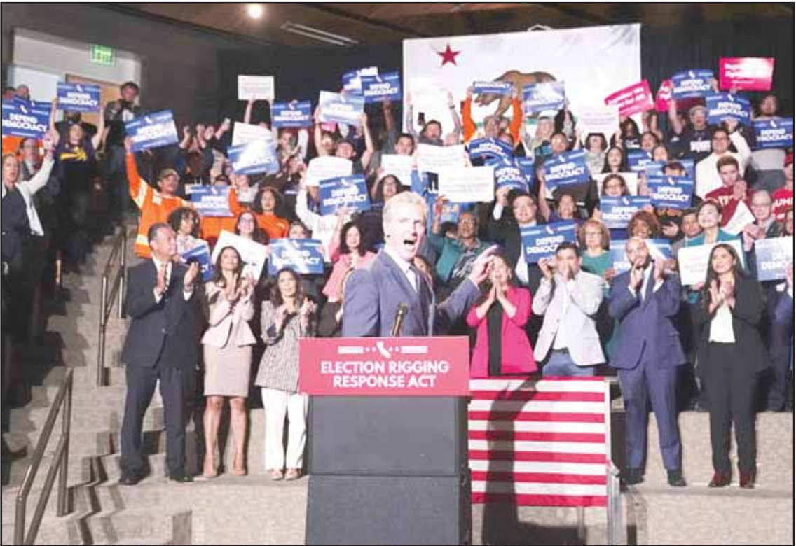
California Gov Gavin Newsom speaks during a news conference on Aug 14, in Los Angeles.

Under the proposal, Democrats would end up with a 10-point registration advantage there after drastic reshaping to include parts of heavily Democratic Sonoma County near the Pacific Coast. In a post on the social platform X, LaMalfa called the proposal “absolutely ridiculous.” In the battleground 41st District east of Los Angeles, home to long-serving Republican Rep. Ken Calvert, Democratic and Republican registration is currently split about evenly. But in the redrawn district, Democratic registration would jump to 46% with GOP registration falling to 26%. Other Republicans whose districts would see major changes intended to favor Democrats include Reps. Kevin Kiley in Northern California, David Valadao in the Central Valley farm belt and Darrell Issa in San Diego County. Also, embattled Democratic incumbents would see their districts padded with additional left-leaning voters.