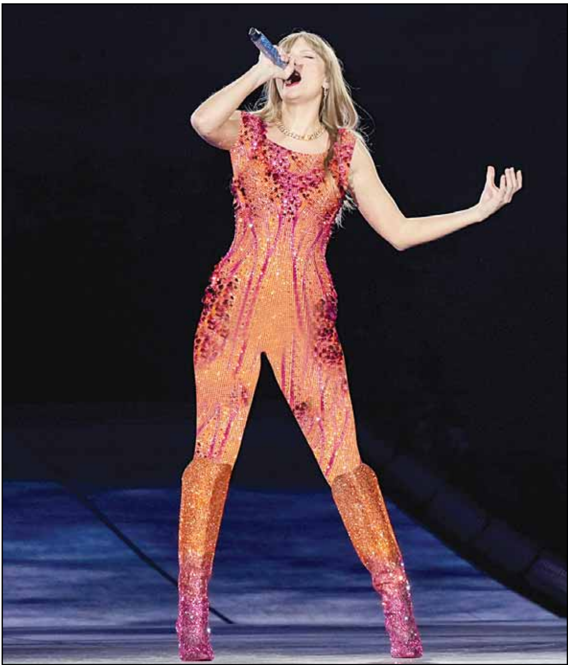
Taylor Swift performs at the Paris Le Defense Arena during her Eras Tour concert in Paris, on May 9, 2024.