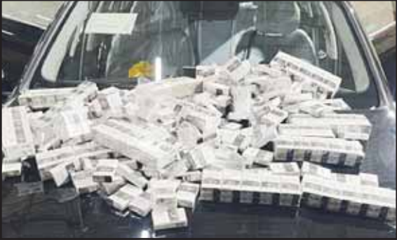
The cartons of cigarettes found hidden in the car.

— Compiled by Mohammad Wangengi/Simi K. Kutty