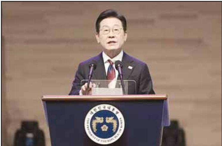
South Korean President Lee Jae Myung speaks during a ceremony to celebrate the 80th anniversary of Korea’s liberation from Japanese colonial rule in Seoul, South Korea on Aug 15. mitted to an international push to denuclearize North Korea and urged Pyongyang to resume dialogue with Washington and Seoul. Amid a prolonged diplomatic stalemate with its rivals, Kim’s government has made clear it has no intention of giving up the weapons it sees as its strongest guarantee of survival and would reject any future talks on denuclearization. “Denuclearization is a complex and difficult task that cannot be resolved quickly,” Lee said. “However, inter-Korean and U.S.-North Korea dialogue as well as international cooperation will help us approach a peaceful resolution.” Japan’s defeat in World War II liberated Korea from colonial rule, but

the peninsula was then divided into a U.S.-backed, capitalist South and a Soviet-supported, socialist North - a separation cemented by the devastating 1950-53 Korean War. Lee’s meeting with Ishiba will come just before he flies to Washington for a meeting with U.S. President Donald Trump over trade and defense issues, a setup that underscores how Trump’s push to reset global trade and US security commitments is drawing the often-feuding neighbors closer. Ishiba, eager to improve ties with Seoul, has acknowledged Japan’s wartime aggression and has shown more empathy toward Asian victims than his recent predecessors.