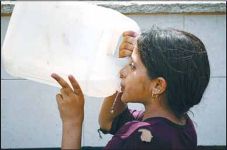
A Palestinian girl drinks water from a jerrycan after collecting it from a water distribution point during a hot summer day with temperatures reaching 36 °C (97 °F) in Deir al-Balah, in the central Gaza Strip, Wednesday, Aug. 13.

became polluted by sewage and the wreckage of bombed buildings. Wells are mostly inaccessible or destroyed, aid groups and the local utility say. Meanwhile, the water crisis has helped fuel the rampant spread of disease, on top of Gaza's rising starvation. UNRWA - the UN agency for Palestinian refugees - said Thursday that its health centers now see an average 10,300 patients a week with infectious diseases, mostly diarrhea from contaminated water. Efforts to ease the water shortage are in motion, but for many the prospect is still overshadowed by the risk of what may unfold before new supply comes. And the thirst is only growing as a heat wave bears down, with humidity and temperatures in Gaza soaring on Friday to 35 degrees Celsius (95 degrees Fahrenheit). Mahmoud al-Dibs, a father displaced from Gaza City to Muwasi, dumped water over his head from a flimsy plastic bag - one of the vessels used to carry water in the camps. "Outside the tents it is hot and inside the tents it is hot, so we are forced to drink this water wherever we go," he said. Al-Dibs was among many who told The Associated Press they knowingly drink non-potable water. The few people still possessing rooftop tanks can't muster enough water to clean them, so what flows from their taps is yellow and unsafe, said Bushra Khalidi, an official with Oxfam, an aid group working in Gaza. Before the war, the coastal enclave's