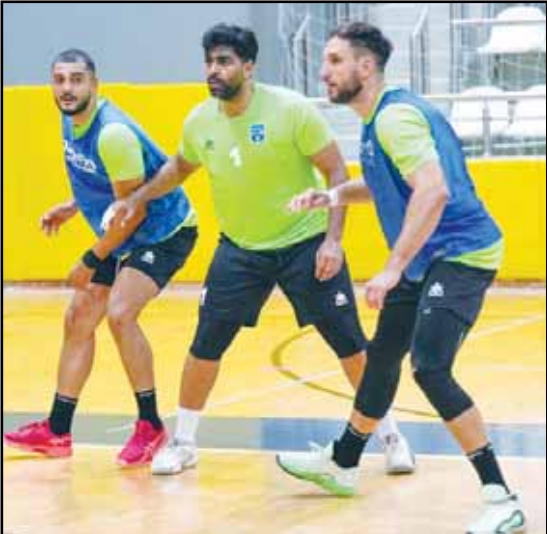
Players intensify training for the new season.