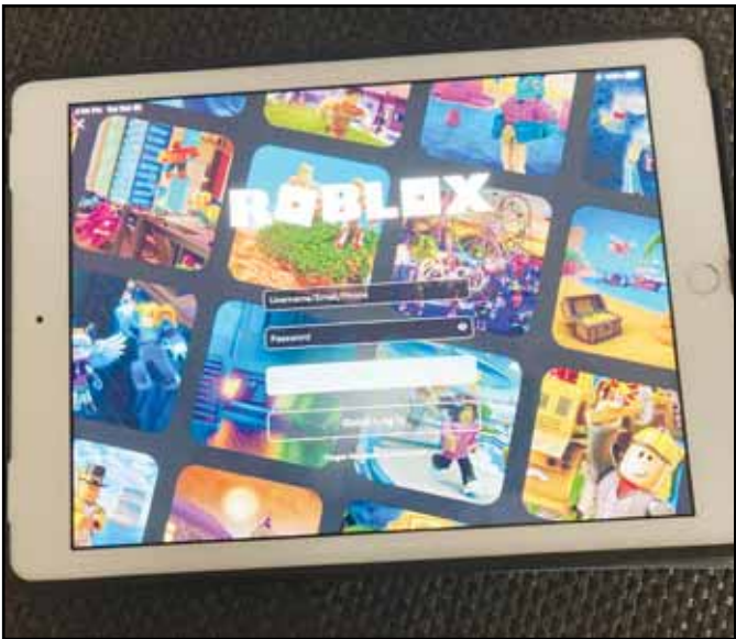
The gaming platform Roblox is displayed on a tablet, Oct. 30, 2021, in New York.