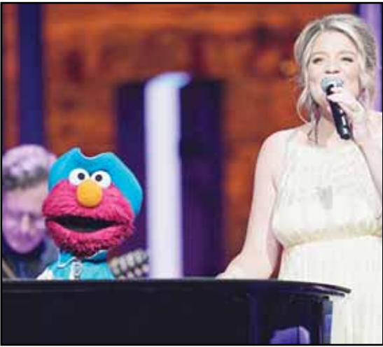
Sesame Street's Elmo, (left), performs with Lauren Alaina at the Grand Ole Opry, Thursday, Aug. 14, in Nashville, Tenn.