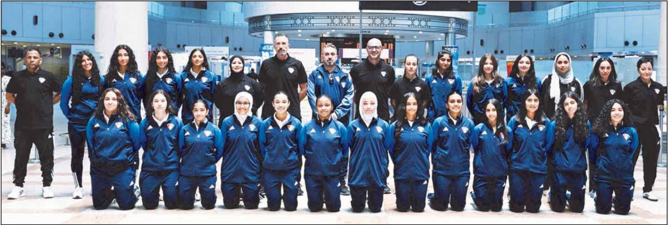
The players pose for a group photo before their departure.