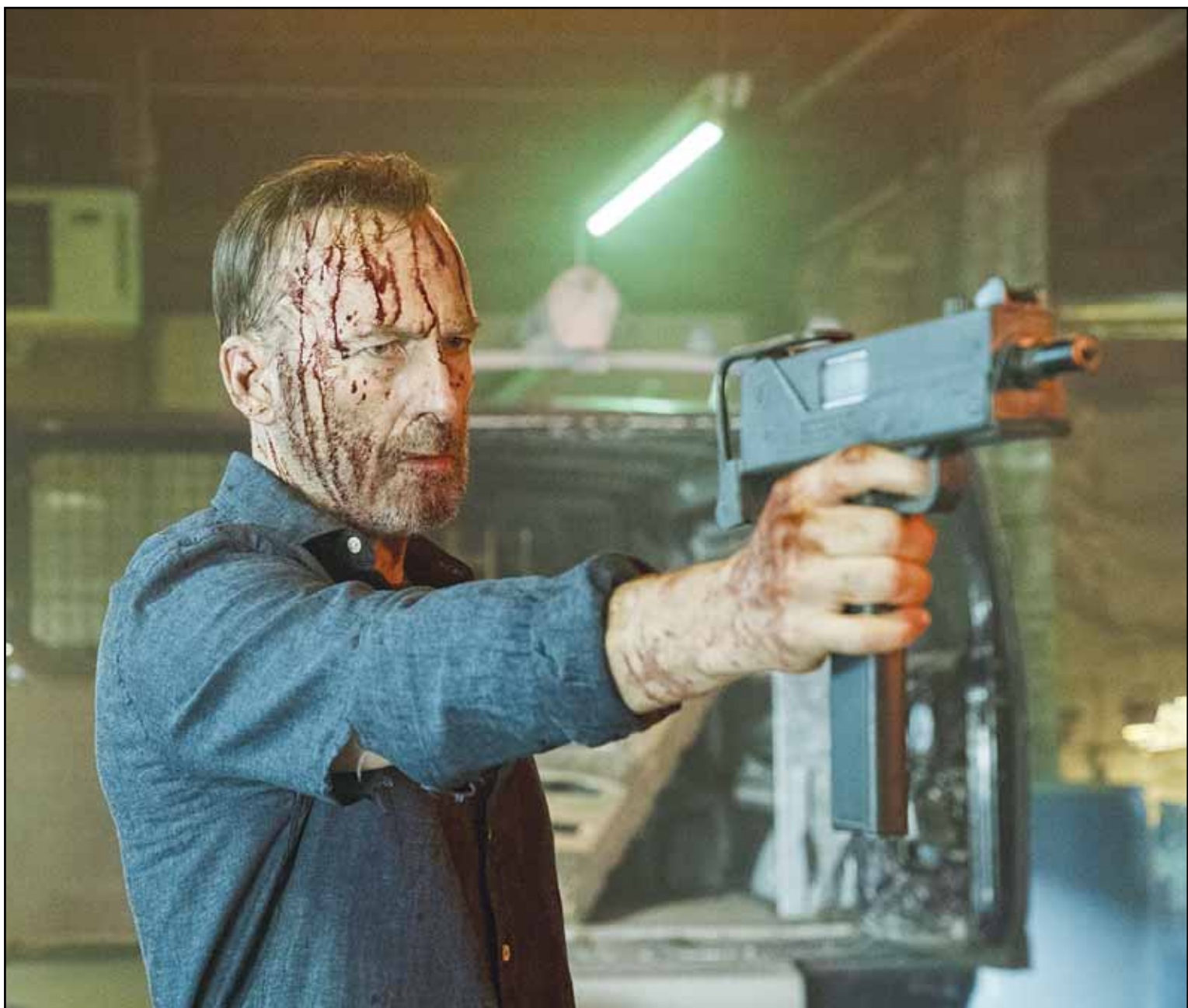
This image released by Universal Pictures shows Bob Odenkirk as Hutch Mansell in ‘Nobody 2.’ (AP)