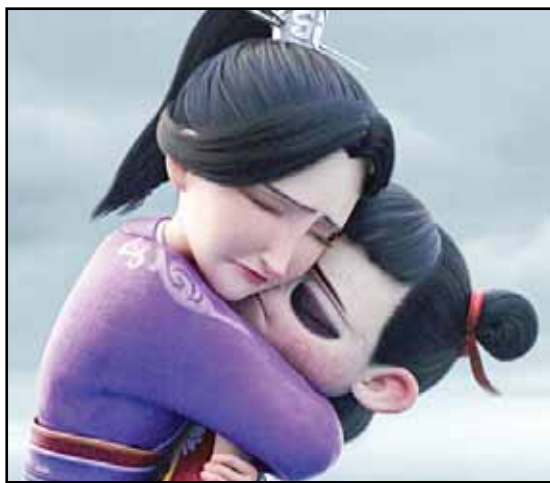
This image released by A24 shows the characters Lady Yin, (left), and Ne Zha in a scene from ‘Ne Zha 2.’

“I think the director and his amazing team, they pushed all the boundaries,” Yeoh said. “They created this magical world that I hadn’t seen to this level of superb anima-