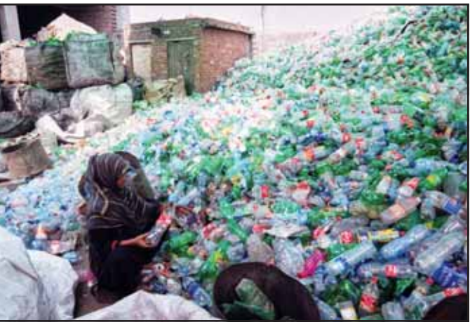
A female worker sorts through empty bottles at a plastic recycling factory in Lahore, Pakistan, Thursday, Aug. 7.

But "If you just think of your own home or apartment, you might have a bright orange hard plastic detergent container on top of your washing machine, and then you might have a plastic bag," Enck said. "Those two things cannot get recycled together." The plastics industry says innovations in material science are helping to incorporate more recycled plastics into products and enable more plastic products to be recyclable. Ross Eisenberg, president of America's Plastic Makers, noted the need for an "all-of-the-above approach." He said this also includes upgrading recycling infrastructure or improving sorting to capture more used plastics. This also means making recycling more accessible and helping consumers know what can and can't go in the recycling bin. But there are a lot of limitations to this. Depending on consumers for accurate pre-sorting is a lot to ask. And cities may hesitate to make costly infrastructure improvements to their recycling programs if there is little financial incentive or market for the recycled material. "Local recycling facilities, or markets for the recycled material, don't always exist. Where the collection and processing infrastructure does exist, the recycling plants are essentially plastic production facilities, with the same air, water, and soil pollution problems that are harmful to local residents," said Holly Kaufman, director of The Plastics & Climate Project and senior fellow at World Resources Institute.