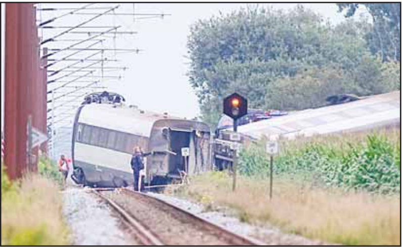
Emergency services attend the passenger train derailment at the village of Bjerrdup between Kliplev and Tinglev in Southern Jutland, Denmark on Aug 15. (AP)

BERLIN, Aug 16, (AP): A passenger train collided with a vehicle at a crossing near the town of Tinglev in southern Denmark on Friday, leaving one person dead and injuring some 20 others. The extent of the injuries is still unclear, but photos from the scene show derailed and overturned carriages. A large number of emergency services were on the scene, and local news outlet TV2 said they had deployed drones and search dogs. The company in charge of operating Denmark’s rail network, Banedanmark, said on X that the accident happened when the train collided with a vehicle at a level crossing.