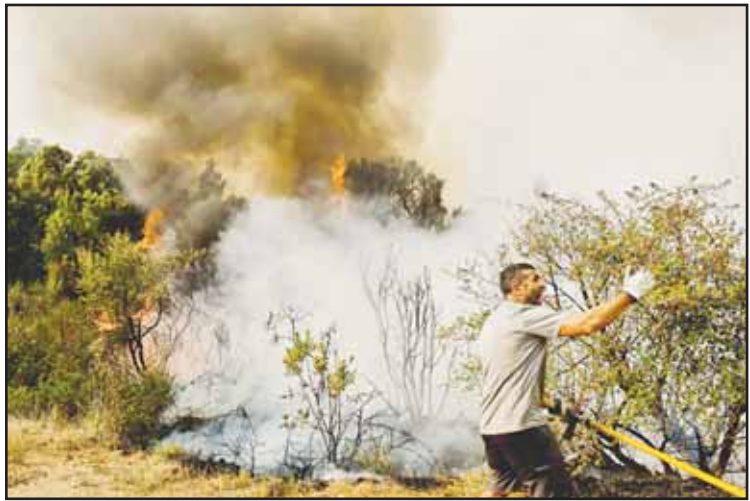
A man tries to put out a wildfire in Larouco, northwestern Spain on Aug 13. (AP)

MADRID, Aug 16, (AP): Firefighters in Spain, Portugal and Greece battled ongoing wildfires Friday, an important religious holiday in all three countries, as persistent hot, dry conditions challenged efforts to contain the blazes. Spain was fighting 14 major fires, according to Virginia Barcones, general director of emergency services. Temperatures were expected to climb over the weekend. “Today will once again be a very tough day, with an extreme risk of new fires,” Spanish Prime Minister Pedro Sánchez wrote on X. The national weather agency AEMET warned of extreme fire risk in most of the country, including where the largest blazes were burning in the north and west. A heat wave which brought temperatures exceeding 40 degrees Celsius (104 Fahrenheit) on several days this month was expected to last through Monday. Fires in the Galicia region forced the closure of several highways. The high speed rail line connecting it to Spain’s capital, Madrid, remained suspended. The fires in Spain this year have burned 158,000 hectares or 610 square miles, according to the European Union’s European Forest Fire Information System. That is an area roughly