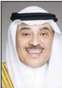
HH the Crown Prince