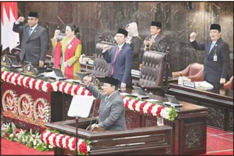
Indonesian President Prabowo Subianto, (centre), delivers his annual State of the Nation address ahead of the country’s Independence Day, in Jakarta, Indonesia on Aug 15. Subianto accused the country’s rice mills of buying the farmers’ unhusked, dry rice below the government-set price of Rp 6,500 (40 U.S. cents) per kilogram and enjoying millions of dollars profit each month from an unfair food trade.