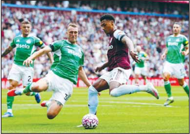
Aston Villa's Ollie Watkins, front right, and Newcastle United's Dan Burnt, front left, challenge for the ball during the English Premier League soccer match between Aston Villa and Newcastle United in Birmingham, England.

Ahead of kickoff, fans held up placards to spell out "DJ20" and "AS30" in two of the stands during a period of silence in honor of the