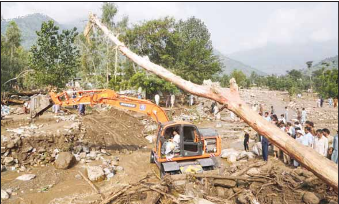
Rescue workers and local residents use heavy machinery to search for bodies of the victims of Friday’s flash flooding through the rubble of damaged houses at Qadir Nagar village near Pir Baba, Buner district, in Pakistan’s northwest on Aug 16.

similar pact with Japan, which will take effect next month. It is in talks with several other Asian and Western countries including France and Canada for similar defense accords. China has deplored multinational war drills and alliances in or near the disputed South China Sea, saying the U.S. and its allies are “gang-ing up” against it and militarizing the region.