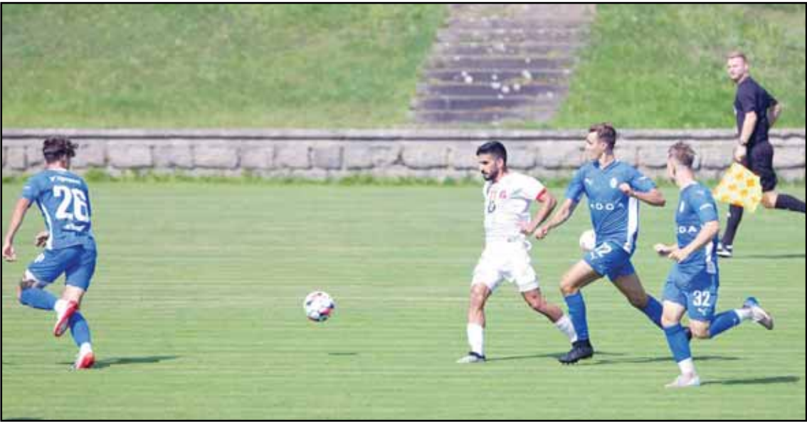
Players run for the ball during a friendly match between Kuwait Club and Mlada Boleslav.