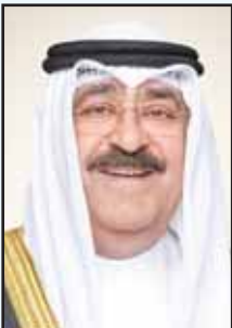
HH the Amir

His Highness the Prime Minister Sheikh Ahmad Abdullah Al-Ahmad Al-Sabah sent a cable of congratulations to President of India Droupadi Murmu on Friday, on her country's National Day.