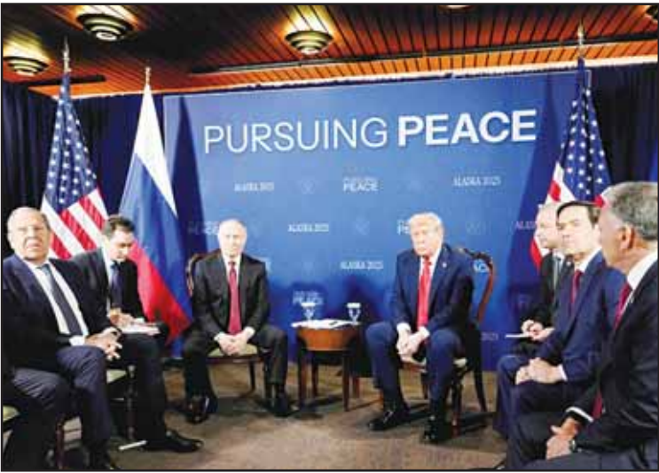
US President Donald Trump meets with Russia’s President Vladimir Putin on Aug 15, at Joint Base Elmendorf-Richardson, Alaska. At left is Russia’s Foreign Minister Sergey Lavrov and second from right is Secretary of State Marco Rubio.

Trump rolled out the red carpet on Friday for Putin, who was in the US for the first time in a decade and since the start of his full-scale invasion of Ukraine. But he gave little concrete detail afterward of what was discussed. On Saturday, he posted on social media that it “went very well.” Trump had warned ahead of the summit of “very severe consequences” for Russia if Putin doesn’t agree to end the war. Zelenskyy reiterated the importance of involving European leaders, who also were not at the summit. “It is important that Europeans are involved at every stage to ensure reliable security guarantees together with America,” he said. “We also discussed positive signals from the American side regarding participation in guaranteeing Ukraine’s security.” He didn’t elaborate, but Zelenskyy previously has said that European partners put on hold a proposal to establish a foreign troop presence in Ukraine to deter future Russian aggression because it lacked an American backstop. Zelenskyy said he spoke to Trump one-on-one and then in a call with other European leaders. In total, the conversations lasted over 90 minutes. Trump said in Alaska that “there’s no deal until there’s a deal,” after Putin claimed the two leaders had hammered out an “understanding” on Ukraine and warned Europe not to “torpedo the nascent progress.”