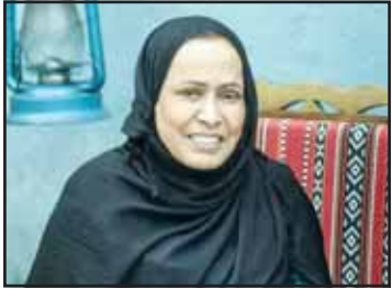
Veteran actress Hayat Al-Fahad

KUWAIT CITY, Aug 16: Veteran actress Hayat Al-Fahad was rushed to the hospital without prior warning after suffering a sudden health issue, which was later diagnosed as a stroke. Following medical evaluation, the attending specialist decided to place her in the Intensive Care Unit (ICU) under 24-hour observation. Visitors are currently not permitted until her condition improves. The Kuwait Federation for Artistic and Theatrical Production and Entertainment Industry, where Al-Fahad