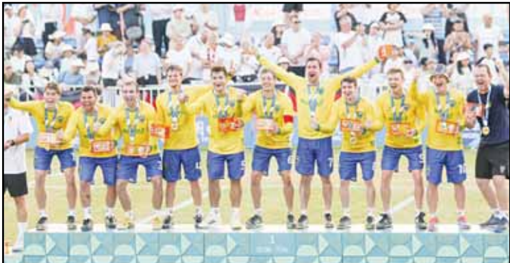
Gold medalists team Brazil pose during the awarding ceremony for the Men's Fistball at The World Games 2025 in Chengdu, southwest China's Sichuan Province.