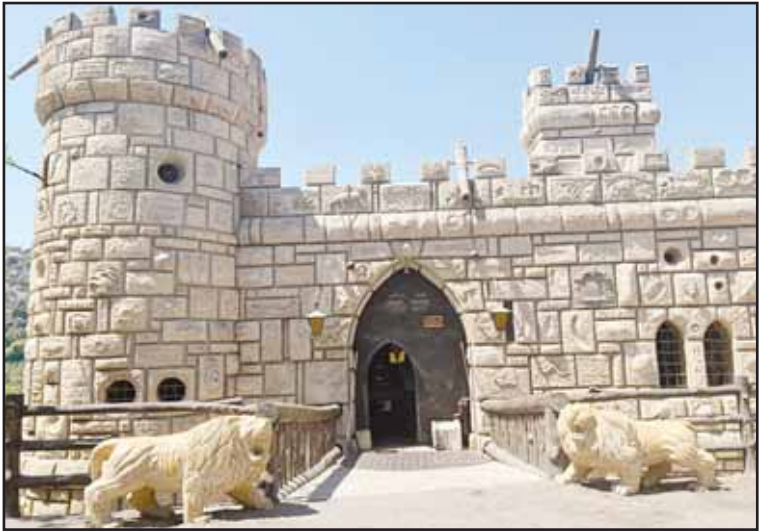
The castle entrance, featuring lions carved by architect Moussa Al-Maamari.

The Moussa Castle Museum, located between the towns of Deir Al-Kamar and Beiteddine, came to fruition due to the relentless efforts of Moussa Al-Maamari, a renowned Lebanese architect. Al-Maamari, born on July 27, 1930, and died on January 31, 2018, established the Museum housing numerous artifacts, gemstones and antique weapons taken straight out of books of