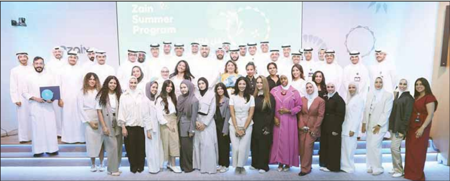
Zain executives and program partners with the sixth cohort graduates.

Over its six seasons, the program has trained more than 250 students from various academic disciplines, offering them a unique opportunity