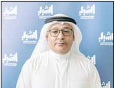
Nasser Al-Sheikh

Al-Sheikh highlighted the country's dedicated efforts to support its youth by