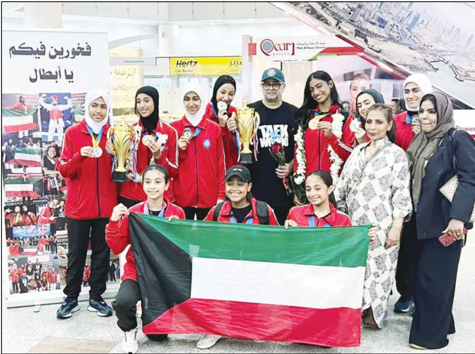
Salwa Sports Club taekwondo team poses with the national flag.

AMMAN, Aug 13: Salwa Sports Club celebrated a major success at the Jordan International Open for Sons of Jordan, held in Amman from August 7-9. The tournament featured over 1,000 athletes from 10 Arab countries, and Salwa's taekwondo team secured nine medals across various categories.