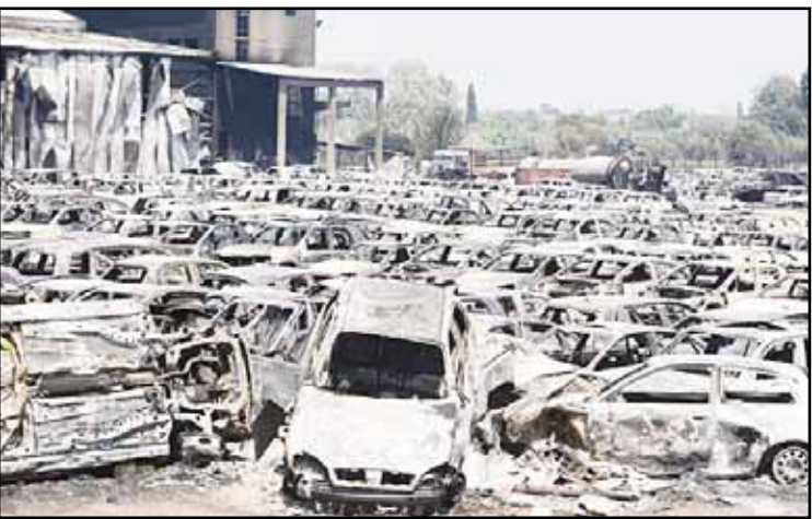
Burned cars are seen at an impound lot in Kato Achaia, during a wildfire near Patras city, western Greece on Aug 13. (AP)

ATHENS, Greece, Aug 13, (AP): Wildfires intensified across southern Europe on Wednesday after a night-long battle to protect the perimeter of Greece’s third-largest city, with at least three more deaths reported in Spain, Turkey and Albania. Outside the Greek port city of Patras, firefighters struggled to protect homes and agricultural facilities as flames tore through olive groves. As water-dropping planes and helicopters swooped overhead, residents joined the effort, beating back flames with cut branches or dousing them with buckets of water. Firefighting resources were stretched thin in many affected countries as they battled multiple outbreaks following weeks of heat waves and temperature spikes across Mediterranean Europe. Aircraft rotated between blazes on the western Greek mainland, the Patras area and the island of Zakynthos. Athens also sent assistance to neighboring Albania, joining an international effort to combat dozens of wildfires. An 80-year-old man died in one blaze south of the capital, Tirana, officials