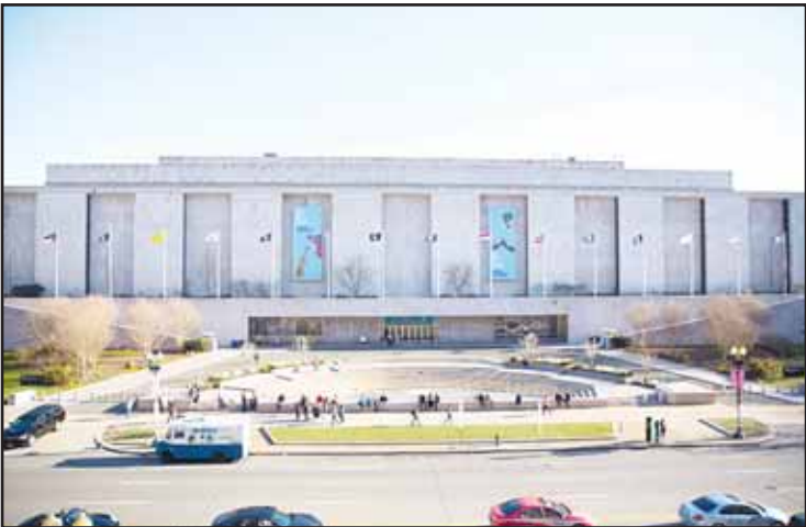
People visit the Smithsonian Museum of American History on the National Mall in Washington, April 3, 2019.

factual presentation of history.” “We are reviewing the letter with this commitment in mind and will continue to collaborate constructively with the White House, Congress, and our governing Board of Regents,” it said in a statement. The review, first reported by The Wall Street Journal, is the latest attempt by the president to bring the country’s cultural institutions in line with his vision. In March, Trump signed an executive order titled “Restoring Truth and Sanity to American History,” which accused the Smithsonian of coming under the influence of a “divisive, race-centered ideology” and called upon it to “remove improper ideology” from the institution’s museums. In February, Trump removed the Kennedy Center’s Board of Trustees, replaced them with his supporters and named himself chairman. He vowed to end events featuring performers in drag, indicating he would take on a larger role in dictating the institution’s programming schedule. The review of the Smithsonian