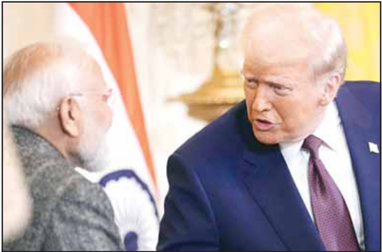
US President Donald Trump, (right), speaks with India’s Prime Minister Narendra Modi during a news conference in the East Room of the White House on Feb 13, in Washington.

SEOUL, South Korea, Aug 13, The wife of South Korea’s jailed former President Yoon Suk Yeol has been arrested as investigators seek to charge her over various suspected crimes, including bribery, stock manipulation and meddling in the selection of a candidate. In granting a special prosecutor’s request for an arrest warrant late Tuesday, the Seoul Central District Court said Kim Keon Hee posed a risk of destroying evidence. The investigation into Kim is one of three special prosecutor probes launched under Seoul’s new liberal government targeting the presidency of Yoon, a conservative who was removed from office in April and rearrested last month over his brief imposition of martial law in December. Also: SEOUL: South Korean President Lee Jae Myung will meet Japanese Prime Minister Shigeru Ishiba in Tokyo next week before flying to Washington for a summit with President Donald Trump, underscoring how Trump’s push to reset global trade is drawing the often-feuding neighbors closer. Lee’s two-day visit to Japan Aug. 23-24 will be an opportunity to deepen personal ties with Ishiba and put bilateral relations on firmer ground. Their