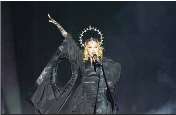
Madonna performs in the final show of her The Celebration Tour, on Copacabana Beach in Rio de Janeiro, Brazil, Saturday, May 4, 2024.

Israel denies a famine is taking place or that children are starving. It says it has supplied enough food throughout the war and accuses Hamas of causing shortages by stealing aid and trying to control food distribution.