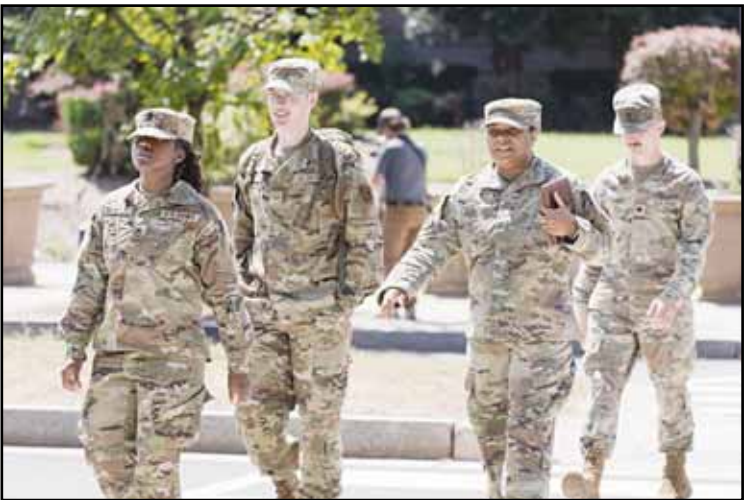
Troops depart the District of Columbia National Guard Headquarters as President Donald Trump implements his order to use federal law enforcement and the National Guard to expel homeless people and rid the nation’s capital of violent crime, in Washington on Aug 12.

there were no specifics on the locations they will be patrolling, according to an official who spoke on condition of anonymity for the same reason. Mayor Muriel Bowser pledged to work alongside the federal officials Trump has tasked with overseeing the city’s law enforcement, while insisting the police chief remained in charge of the department and its officers. “How we got here or what we think about the circumstances - right now we have more police, and we want to make sure we use them,” she told reporters. The tone was a shift from the day before, when Bowser said Trump’s plan to take over the Metropolitan Police Department and call in the National Guard was not a productive step and argued his perceived state of emergency simply doesn’t match the declining crime numbers. Still, the law gives the federal government more sway over the capital city than in U.S. states, and Bowser said her administration’s ability to push back is limited. Attorney General Pam Bondi posted