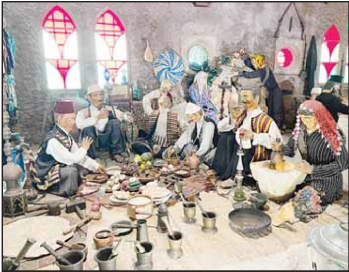
A wax model depicting a family feast in ancient Lebanese villages.