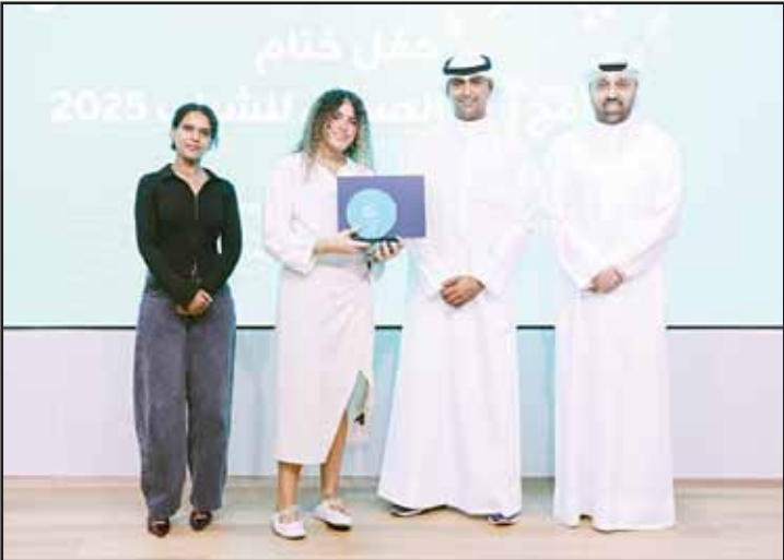
Honoring a distinguished student.

to gain practical experience and professional skills in an environment that mirrors the private sector work environment.