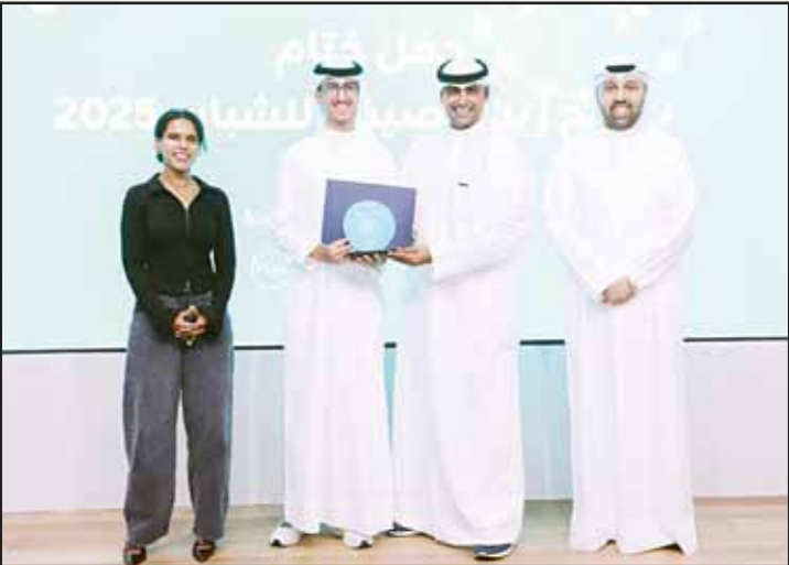
Honoring one of the students.