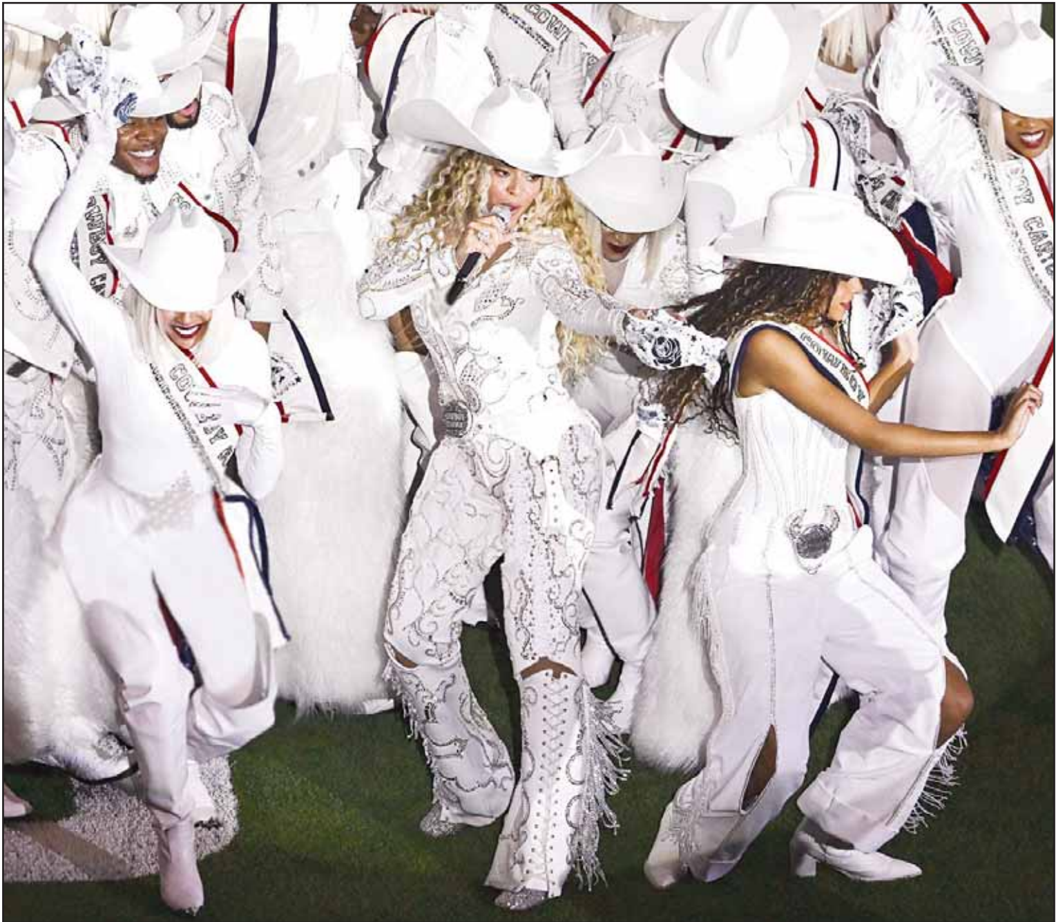
Beyoncé, (center), is joined by her daughter Blue Ivy, (right), during a halftime performance in an NFL football game between the Baltimore Ravens and the Houston Texans, Dec. 25, 2024, in Houston.