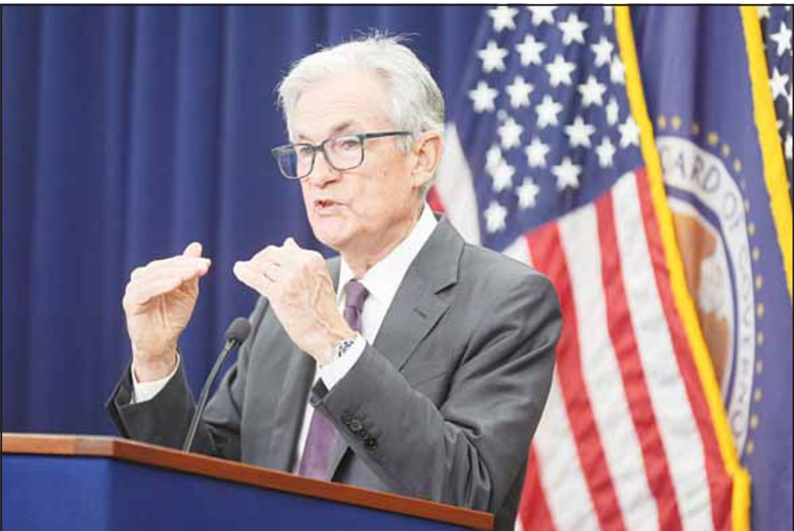
Federal Reserve Chairman Jerome Powell, speaks during a news conference following the Federal Open Market Committee meeting, Wednesday, July 30, 2025, in Washington.

Chair Jerome Powell has warned that worsening inflation could keep the Fed on the sidelines - a stance that has enraged Trump, who has defied traditional norms of central bank independence and demanded lower borrowing costs. On Tuesday, Trump attacked Powell again for not cutting rates and suggested he would allow a lawsuit against the Fed to proceed because of the rising costs of its extensive building renovation. It wasn’t clear what lawsuit he was referring to. On a monthly basis, prices rose 0.2% in July, down from 0.3% the previous month, while core prices ticked up 0.3%, a bit faster than the 0.2% in June. Gas prices fell 2.2% from June to July and have plunged 9.5% from a year earlier, the government’s report said. Grocery prices slipped 0.1% last month, though they are still 2.2% higher than a year ago. Tariffs appeared to raise the cost of some imported items: Shoe prices jumped 1.4% from June to July,