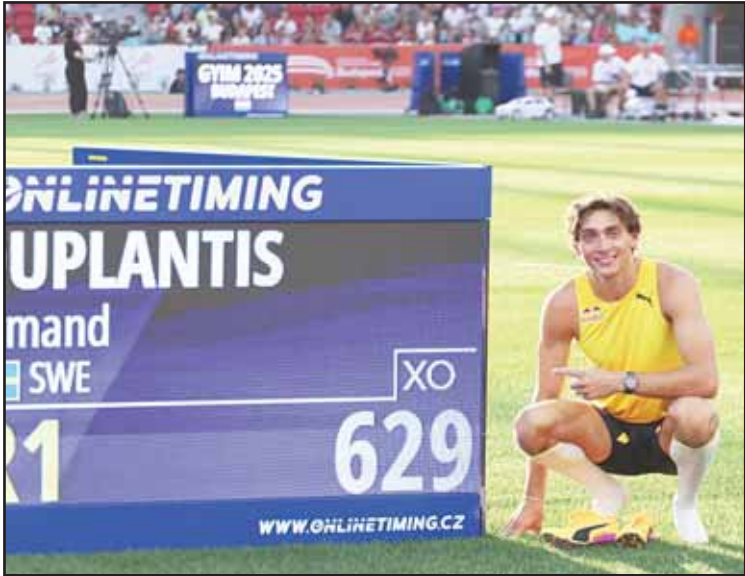
Armand Duplantis of Sweden poses with the scoreboard after setting a new pole vault world record at 6.29 meters in the Men’s Pole Vault event at the Gyulai Istvan Memorial - Hungarian Athletics Grand Prix in Budapest, Hungary.