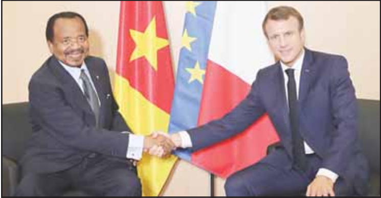
Cameroon President Paul Biya, (left), and France’s President Emmanuel Macron shake hands prior to bilateral talks at the Lyon’s congress hall, central France on Oct 10, 2019.

DAKAR, Senegal, Aug 13, French President Emmanuel Macron acknowledged that France waged a war marked by “repressive violence” in Cameroon before and after the country’s independence in 1960 in a letter made public Tuesday. It is France’s first official acknowledgment of its repression of Cameroon’s independence movement as a war. The letter sent last month to Cameroonian President Paul Biya, follows a report released in January by a French-Cameroonian commission of historians. The report revealed that France carried out mass forced displacements, detained hundreds of thousands of Cameroonians in internment camps, and backed brutal militias to suppress the country’s fight for independence and sovereignty between 1945 and 1971. The commission was established by Macron during a 2022 visit to the capital Yaoundé. It examined France’s role leading up to Cameroon’s independence on Jan. 1, 1960, and in the years