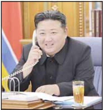
In this photo provided by the North Korean government, its leader Kim Jong Un speaks with Russian President Vladimir Putin on the phone at an undisclosed location in North Korea on Aug 12.

TOKYO, Aug 13, (Agencies): North Korean leader Kim Jong Un has expressed his full support for Russia during a phone conversation with Russian President Vladimir Putin, as North Korea’s state media reported on Wednesday. The two leaders held talks during a phone call on Tuesday, it is the first time Pyongyang has disclosed details of a phone call between its leader and a foreign head of state, according to the official Korean Central News Agency (KCNA). The conversation took place ahead of Putin’s planned summit with US President Donald Trump in Alaska on Friday. Putin congratulated Kim on the upcoming 80th anniversary of Korea’s liberation from Japanese colonial rule on Aug 15, the KCNA said. Kim “expressed firm conviction that the DPRK would always remain faithful to the spirit of the DPRK-Russia treaty and fully support all measures to be taken by the Russian leadership in the future,” the KCNA reported. The treaty, signed in June 2024, includes a mutual defense clause requiring military assistance without delay if either side comes under attack. Putin lauded the “bravery” and “heroism” of Korean People’s Army personnel in operations to liberate Kursk, part of Russian territory, the KCNA said. North Korea has deployed troops