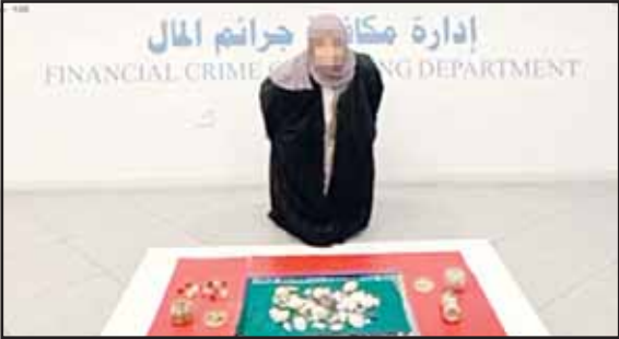
The Kuwaiti woman arrested with talismans and other items used for sorcery.

He emphasized that this step is part of the military’s plan to reinforce job discipline and enhance the efficiency of human resource management.