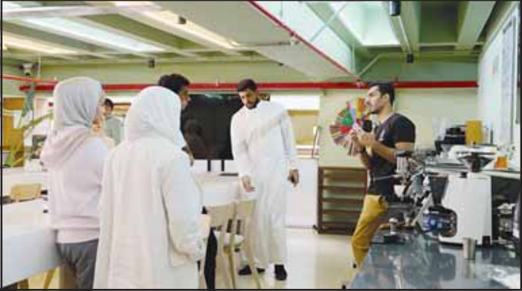
Students partaking in specialized coffee brewing course.