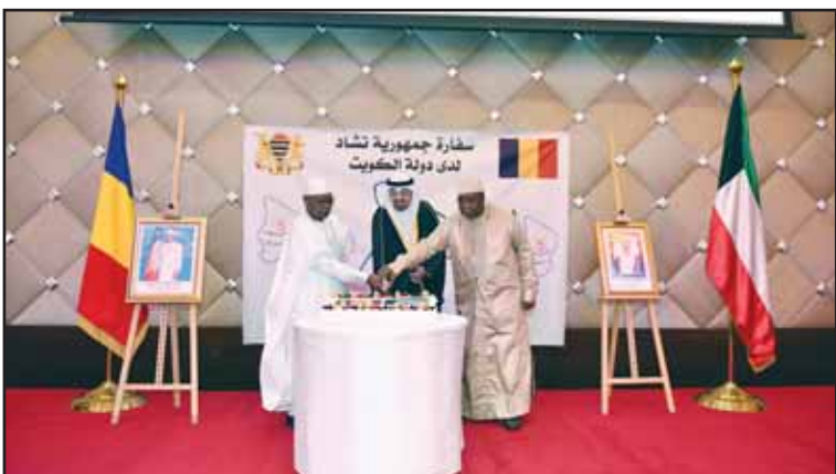
Ceremonial cutting of the cake during the celebration marking the 65th anniversary of the Independence of the Republic of Chad. -- See Page 5