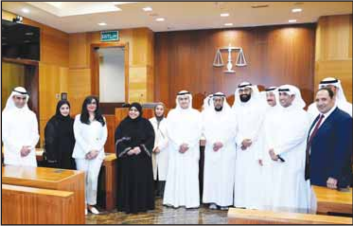
A group photo with the Minister of Justice during an inspection tour at the Farwaniya Courts Complex in Al-Raqqa.