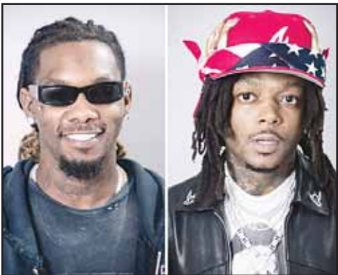
This combination of images shows Offset, (left), and JID during a portrait session on Tuesday, Aug. 5, in New York.

It’s also evident on the lead single, “WRK,” an examination of ambition, and the surprising run up to his album release. JID embarked on the J. Cole-inspired “Dollar & A Dream” Tour, a series of exclusive performances across the US, where attendees only needed to pay a buck for entry.