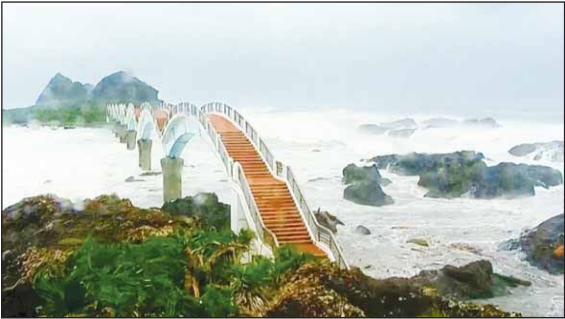
In this image made from video released by Taitung County Government, strong waves and heavy rain pounded the Samsilantai tourist spot on Aug 13 as Typhoon Podul reaches Taitung, eastern Taiwan.

their deepening ties and war efforts against Ukraine, the countries’ state media said Wednesday. Putin also shared with Kim information about his upcoming talks with Trump scheduled to take place Friday in Alaska, according to Russia’s TASS news agency, citing the Kremlin. The North Korean reports did not mention the Trump meeting. Since Russia’s invasion of Ukraine, Kim has made Moscow the priority of his foreign policy as he aims to break out of diplomatic isolation and expand relations with countries confronting Washington. His government has dismissed Washington and Seoul’s stated desires to restart diplomacy aimed at defusing the North’s nuclear program, which derailed in 2019 following a collapsed summit with Trump during his first term. According to South Korean assessments, North Korea has sent around 15,000 troops to Russia since last fall and also supplied large quantities of military equipment, including artillery and ballistic missiles, in support of Putin’s war efforts against Ukraine. Kim has also agreed to send thousands of military construction workers and deminers to Russia’s Kursk region, a deployment South Korean intelligence believes could happen soon.