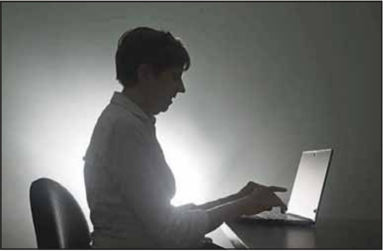
In this Monday, Dec. 12, 2016 photo, a woman types on her laptop, in Miami.

Applying for unemployment benefits as soon as possible can