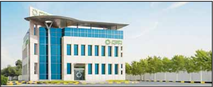
Kuwait Finance House branch

stc Kuwait is a world-class digital leader providing innovative services and solutions to customers, both for individuals and enterprises, enabling the digital transformation in Kuwait, and is a subsidiary of stc Group. stc Kuwait has expanded its portfolio by acquiring companies such as Qualitynet General Trading and Contracting Company (solutions by stc) in Kuwait, and e-portal Holding Company and its subsidiaries.