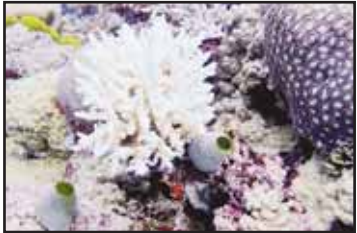
Minor bleaching is seen to a Acropora colony at Lagoon Reef at the northern Great Barrier Reef in far North Queensland, Australia, Dec. 18, 2024. (AP)

MELBOURNE, Australia, Aug 13, (AP): The Great Barrier Reef has experienced its greatest annual loss of live coral across most of its expanse in four decades of record-keeping, Australian authorities say. But due to increasing coral cover since 2017, the coral deaths - caused mainly by bleaching last year associated with climate change - have left the area of living coral across the iconic reef system close to its long-term average, the Australian Institute of Marine Science said in its annual survey recently. The change underscores a new level of volatility on the UNESCO World Heritage Site, the report said. Mike Emslie, who heads the tropical marine research agency’s long-term monitoring program, said the live coral cover measured in 2024 was the largest recorded in 39 years of surveys. The losses from such a high base of coral cover had partially cushioned the