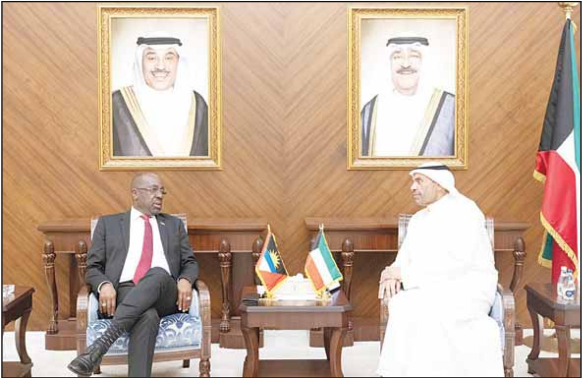
Minister of Foreign Affairs Abdullah Al-Yahya in talks with the visiting Antigua and Barbuda's Minister of Foreign Affairs, Trade, and Barbuda Affairs Everly Paul Chet Greene, along with his accompanying delegation.