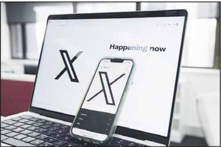
The opening page of X is displayed on a computer and phone in Sydney on Oct. 16, 2023.

SAN FRANCISCO, Aug 13, Billionaire SpaceX, Tesla and X owner Elon Musk says he plans to sue Apple for not featuring X and its Grok artificial intelligence chatbot app in its top recommended apps in its App Store. Musk posted the comments on X late Monday, saying, “Hey @Apple App Store, why do you refuse to put either X or Grok in your ‘Must Have’ section when X is the #1 news app in the world and Grok is #5 among all apps? Are you playing politics? What gives? Inquiring minds want to know.” Grok is owned by Musk’s artificial intelligence startup xAI. Musk went on to say that “Apple is behaving in a manner that makes it impossible for any AI company besides OpenAI to reach #1 in the App Store, which is an unequivocal antitrust violation. xAI will take immediate legal action.” He gave no further details. In an emailed statement, Apple de