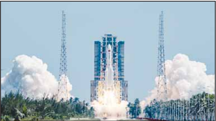
A Long March-5B carrier rocket carrying a group of low Earth orbit satellites blasts off from the Wenchang Space Launch Site in south China’s Hainan Province, Aug. 13.