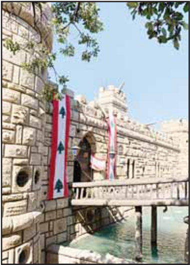
The castle’s entrance, with a wooden bridge evoking medieval designs.