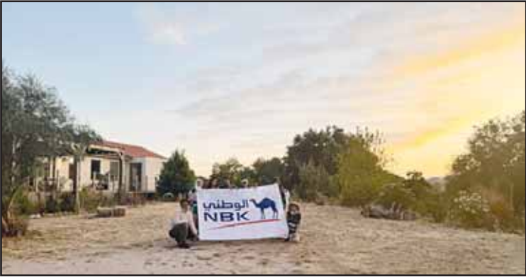
NBK's Green Adventure program.

This sponsorship comes as an emphasis of NBK's leadership in social responsibility and its commitment to investing in future generations, as it firmly believes in the effectiveness of such initiatives that contribute to