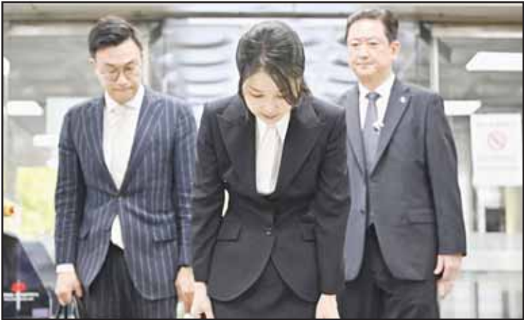
South Korea’s former first lady Kim Keon Hee, (center), wife of impeached president Yoon Suk Yeol, arrives at a court to attend a hearing to review her arrest warrant requested by special prosecutors, in Seoul, South Korea on Aug 12.

SEOUL, South Korea, Aug 13, The wife of South Korea’s jailed former President Yoon Suk Yeol has been arrested as investigators seek to charge her over various suspected crimes, including bribery, stock manipulation and meddling in the selection of a candidate. In granting a special prosecutor’s request for an arrest warrant late Tuesday, the Seoul Central District Court said Kim Keon Hee posed a risk of destroying evidence. The investigation into Kim is one of three special prosecutor probes launched under Seoul’s new liberal government targeting the presidency of Yoon, a conservative who was removed from office in April and rearrested last month over his brief imposition of martial law in December. Also: SEOUL: South Korean President Lee Jae Myung will meet Japanese Prime Minister Shigeru Ishiba in Tokyo next week before flying to Washington for a summit with President Donald Trump, underscoring how Trump’s push to reset global trade is drawing the often-feuding neighbors closer. Lee’s two-day visit to Japan Aug. 23-24 will be an opportunity to deepen personal ties with Ishiba and put bilateral relations on firmer ground. Their