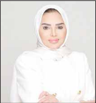
Dr. Amthal Al-Huwailah, Minister of Social, Family and Childhood Affairs

This decision is part of the firm approach of the ministry in controlling institutional performance, enhancing transparency, and ensuring adherence to the laws in order to protect public funds and the reputation of charitable work in the State of Kuwait.