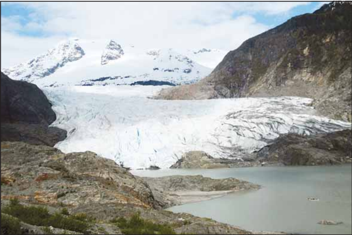
A canoe, bottom right, glides on Mendenhall Lake, in front of the Mendenhall Glacier, on May 18, in Juneau, Alaska.