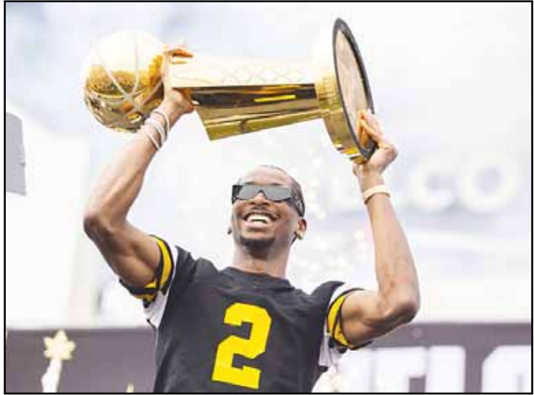
Oklahoma City Thunder’s Shai Gilgeous-Alexander holds up the Larry O’Brien Trophy during a ceremony honoring the NBA basketball champion in Hamilton, Ontario.

NEW YORK, Aug 13, The Oklahoma City Thunder felt slighted last season when they were left off the NBA’s Christmas schedule. That won’t be an issue this year. MVP Shai Gilgeous-Alexander and the NBA champion Thunder will be working at home for Christmas this season, playing host to Victor Wembanyama and the San Antonio Spurs as part of the league’s annual Dec. 25 quintupleheader. BetMGM Sportsbook has the Thunder favored by 9.5 points. The other Christmas games, released by the NBA on Tuesday: Cleveland at New York (favored at -2.5), Houston at LeBron James and the Los Angeles Lakers (-1.5), No. 1 pick Cooper Flagg and Dallas visiting Golden State (-4.5), and Minnesota playing at Denver (-4.5). Some NBA Cup games are scheduled to be released on Wednesday, and the full schedule - 80 of the 82 games for all teams - is to be released on Thursday. The remaining two games for each club will be filled in December based on how teams fare in the NBA Cup. “They make the schedule. We play it,” Thunder coach Mark Daigneault said last season, when asked about his club not being picked for the Dec. 25 lineup. “Our players, I know, would have liked to play on Christmas because that’s such a staple day in the NBA season. But we can’t control that.” Well, they sort of did control their Christmas scheduling fate this season.