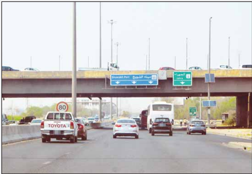
Motorists weave through dusty, sun-baked roads as Kuwait sizzles under 50°C heat on Wednesday.