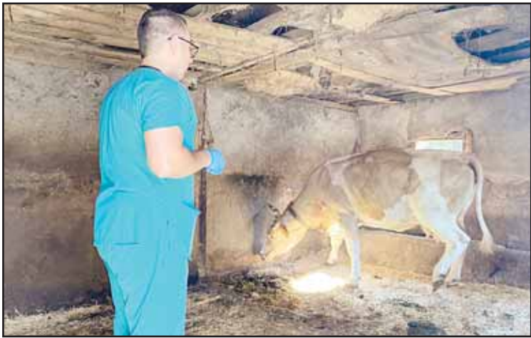
A veterinarian vaccinates a cow against the foot-and-mouth disease in a barn in Limankoy village, Kırklareli province, Türkiye, on Aug. 11. (Xinhua)

KIRKLARELI, Türkiye, Aug 13, (Xinhua): Turkish authorities and veterinarians are warning of the swift spread of foot-and-mouth disease, which has placed farmers nationwide, particularly in the Thrace region, on high alert, and forced local livestock markets to close. The outbreak, first detected on July 10 in Ardahan province, is rapidly advancing westward from the eastern provinces of Ardahan, Kars, and Iğdir, noted Gulay Erturk, president of the Turkish Veterinary Association. Emphasizing the high risk in Thrace, Erturk said close monitoring is required as even vaccinated animals are showing mild signs of the virus. More veterinarians need to be deployed swiftly to reach and vaccinate animals in the field, she said.