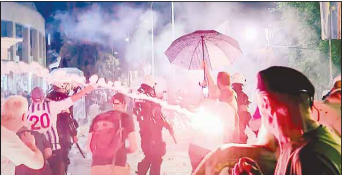
An image taken from video shows fireworks flying as clashes erupted at protests in Vrbas, Serbia on Aug 12, between opponents and supporters of the government in an escalation of tensions following more than nine months of persistent demonstrations against populist President Aleksandar Vucic.