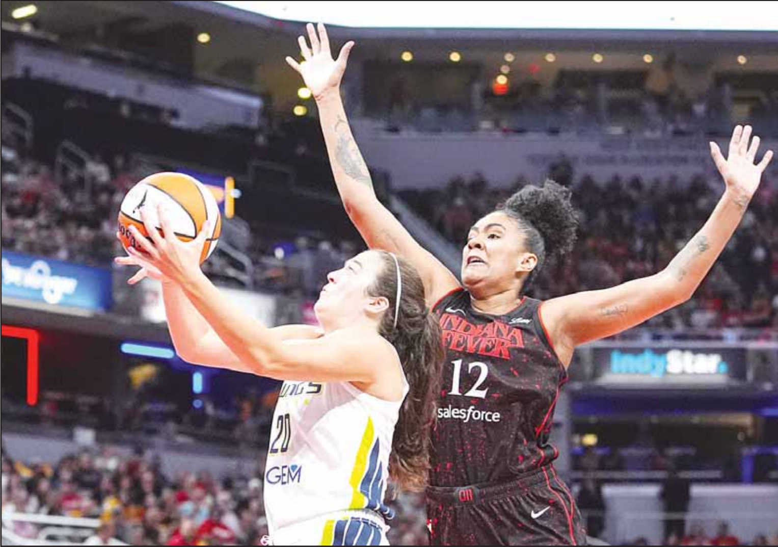
Dallas Wings forward Maddy Siegrist (20) shoots in front of Indiana Fever forward Damiris Dantas (12) in the first half of a WNBA basketball game in Indianapolis.

INDIANAPOLIS, Aug 13, Maddy Siegrist tied a career high with 22 points in her first start since June 6, Li Yueru added 20 points off the bench, and the Dallas Wings held off the Indiana Fever 81-80 to end a five-game losing streak. Paige Bueckers’ wraparound pass to Myisha Hines-Allen for a 3-pointer gave the Wings a 78-61 lead with 6:38 left in the fourth quarter. But Dallas made only one more field goal the rest of the way - a three-point play by Yueru with 2:31 left. Indiana - again playing without Caitlin Clark (groin) who missed her 20th game this season - scored 13 straight points to begin a game-closing 19-3 run that Kelsey Mitchell capped with 33.4 seconds left on a tough shot in the lane. Bueckers missed a jumper from the free-throw