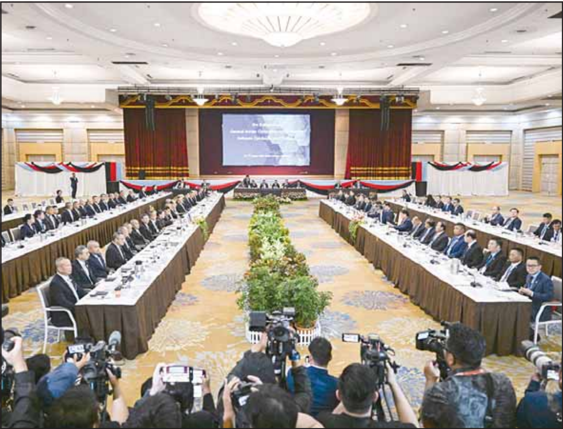
This photo taken on Aug 7, 2025 shows an extraordinary General Border Committee (GBC) meeting held in Kuala Lumpur, Malaysia. Cambodia and Thailand on Thursday signed an agreement on ceasefire arrangements, representatives of the two countries said after an extraordinary General Border Committee (GBC) meeting held in the Malaysian capital.