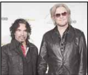
Hall of Fame inductees John Oates, left, and Daryl Hall appear in the press room at the Rock and Roll Hall of Fame Induction Ceremony, April, 10, 2014, in New York.

The Times asked Hall in February if the ship had sailed on mending the pair's relationship.