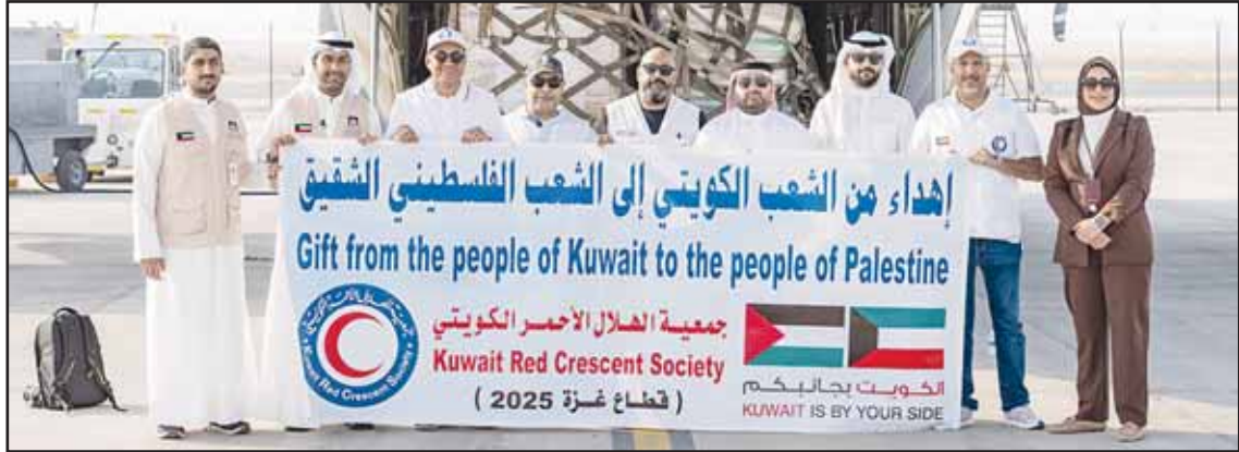
Officials from various organizations who coordinated efforts for delivery of humanitarian aid to Gaza Palestinians.

At the same time, it stressed the need to adhere to the deadlines to avoid disciplinary action that may be taken by the relevant authorities. It added that employees who previously uploaded their academic certificates can verify if they are in the system by following the same steps outlined above to ensure that the data are correct and up-to-date.