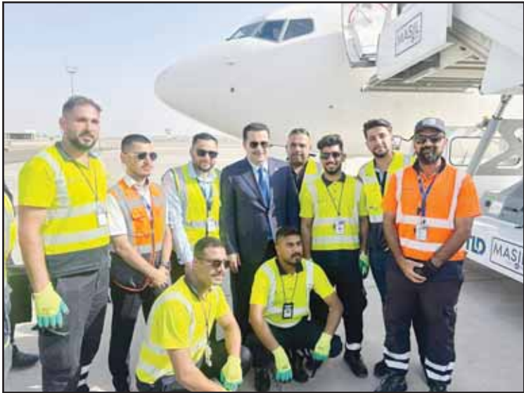
Iraq's PM Mohammed Shia' Al Sudani with a MASIL team.

milestone in the continued growth of the MASIL joint venture across Iraq and demonstrates Menzies' commitment to supporting the country's aviation infrastructure and long-term development.