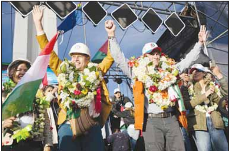
Bolivian presidential candidate Rodrigo Paz, (right), and running mate Edman Lara join hands during a campaign rally in El Alto, Bolivia on Aug 10.