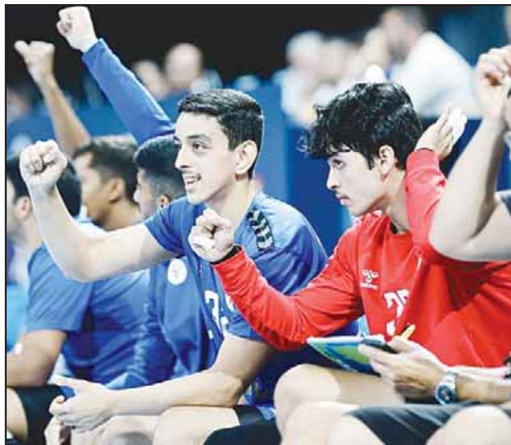
Players cheer during Kuwait-Morocco match at the Under-19 World Championship in Cairo.

On the same day, Al-Arabi Club sent letter No. 568-2025 to the Handball Federation, urging it to stop issuing and publishing invalid circulars and decisions that result in financial losses and constitute criminal offenses under Law No. 1