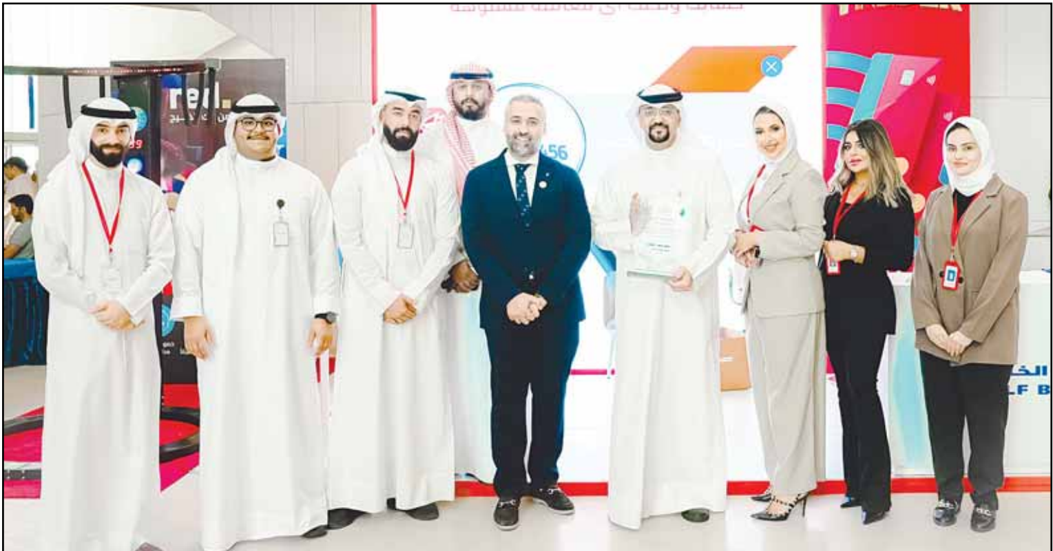
Gulf Bank wraps up its active role in university admission fairs.

KUWAIT CITY, Aug 12: As part of its ongoing commitment to supporting education and empowering Kuwaiti youth, Gulf Bank has successfully concluded its distinguished participation in the university admission fairs at Kuwait University and Abdullah Al-Salem University. The Bank actively engaged with new students, introducing them to its tailored banking solutions designed specifically for young people. Gulf Bank took part in the interactive admission fair held at Kuwait University's Sabah Al-Salem University City in Al-Shadadiya from 19 to 29 July 2025. The Bank's booth attracted a high turnout from students and parents, who showed great interest in the banking services designed for university students. Similarly, the Bank participated in the admission fair hosted by Abdullah Al-Salem University at its Khaldiya campus from 6 to 17 July 2025. Gulf Bank's presence featured direct interaction with visitors, providing comprehensive information on student accounts and other tailored services. These participations are part of Gulf Bank's continuous efforts to strengthen engagement with