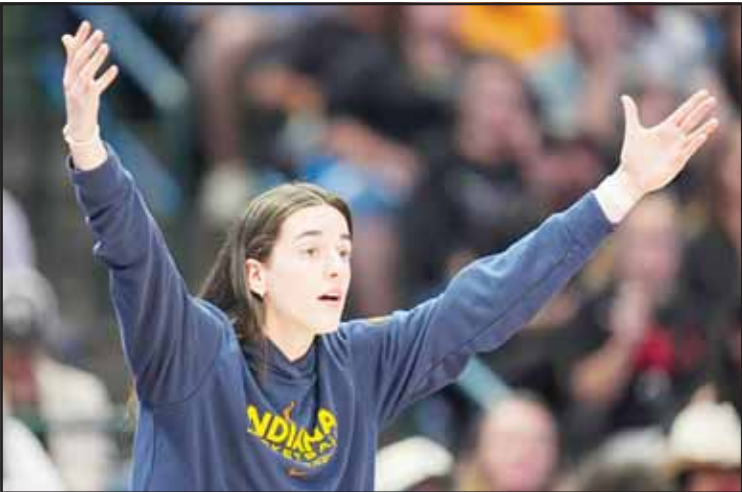
Indiana Fever guard Caitlin Clark reacts during the first half of a WNBA basketball game against the Dallas Wings in Dallas.