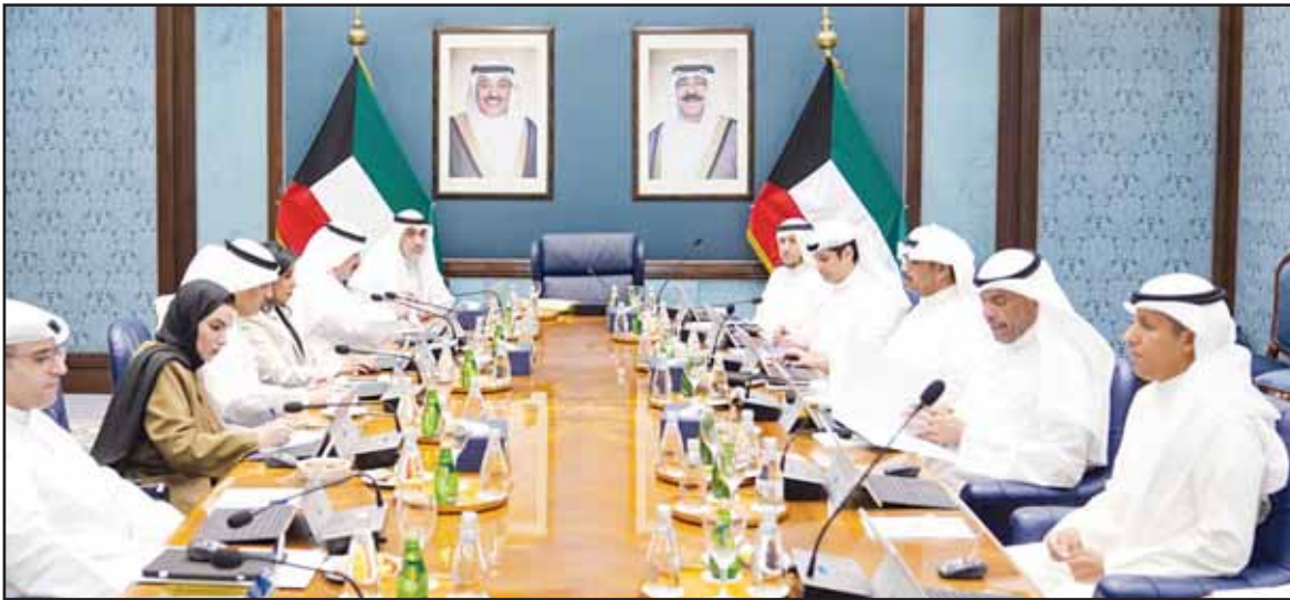
Acting Prime Minister and Minister of Interior Sheikh Fahad Yousef Saud Al-Sabah chairs the weekly Cabinet meeting on Tuesday.

KUWAIT CITY, Aug 12, (KUNA): The Kuwaiti Cabinet has announced that work in all ministries, government bodies, public institutions, and agencies will be suspended on Thursday, September 4, 2025, on the occasion of the Prophet's Birthday (1447 AH).