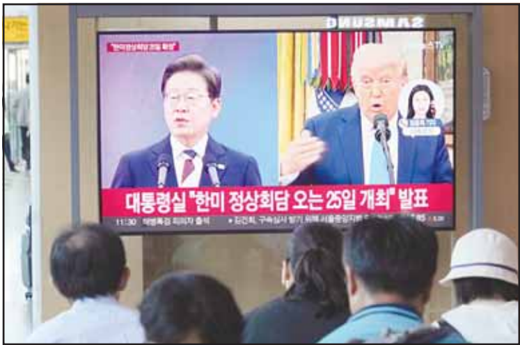
People watch a TV screen showing a file image of South Korean President Lee Jae Myung, (left), and US President Donald Trump during a news program at the Seoul Railway Station in Seoul, South Korea on Aug 12. The signs read, ‘The presidential office announced that the South Korea-U.S. summit will be held on the 25th.’