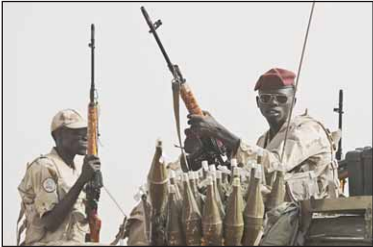
Sudanese soldiers from the Rapid Support Forces unit, led by Gen. Mohammed Hamdan Dagalo, the deputy head of the military council, secure the area where Dagalo attends a military-backed tribe’s rally, in the East Nile province, Sudan on June 22, 2019.

CAIRO, Aug 12, Sudan’s paramilitary Rapid Support Forces launched attacks Monday in a famine-stricken displacement camp outside of el-Fasher, the capital of North Darfur province, killing 40 people, local rights groups said. The Emergency Response Rooms group working at the Abu Shouk displacement camp said in a statement on Facebook that the RSF - which is at war with the Sudanese military - raided parts of the camp targeting citizens inside their homes. The community activist group, which provides assistance across Sudan, said at least 19 people were also injured. The Abu Shouk displacement camp outside of el-Fasher, which houses around 450,000 displaced people, has been repeatedly attacked over the course of the war. The Sudanese military has control over el-Fasher despite frequent strikes by the RSF. Meanwhile, the Resistance Committees in el-Fasher confirmed the attacks, saying on Facebook that the scene “reflected the extent of the horrific violations committed against innocent, defenseless people.” The Resistance Committees are a group of local citizens from the community that includes human rights activists.