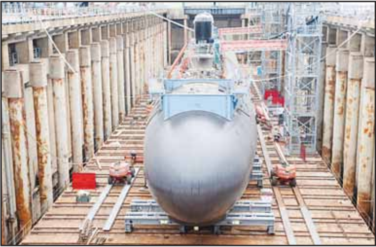
Shipyard workers at General Dynamics Electric Boat in Groton, Conn., prepare a submarine for float-off, July 30, 2015.

global security concerns while struggling with a hollowed-out industrial base that has hamstrung US capabilities to build enough warships. The review is being led by Elbridge Colby, the No. 3 Pentagon official, who has expressed skepticism about the partnership. "If we can produce the attack submarines in sufficient number and sufficient speed, then great. But if we can't, that becomes a very difficult problem," Colby said during his confirmation hearing in March. "This is getting back to restoring our defense industrial capacity so that we don't have to face these awful choices but rather can be in a position where we can produce not only for ourselves, but for our allies." As part of the $269 billion AUKUS partnership, the United States will sell three to five Virginia-class nuclear-powered submarines to Australia, with the first delivery scheduled as soon as 2032. The US and the UK would help Australia design and build another three to five attack submarines to form an eight-boat force for Australia. A March report by the Congressional Research Service warned that the lack of US shipbuilding capacities, including workforce shortage and insufficient supply chains, is jeopardizing the much-celebrated partnership. If the US should sell the vessels to Australia, the US Navy would have a shortage of attack submarines for two decades, the