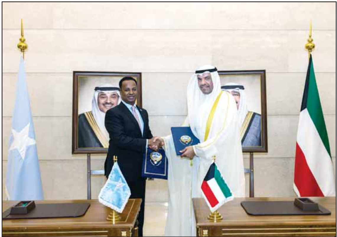
Foreign Minister Abdullah Al-Yahya meets with the Minister of Foreign Affairs and International Cooperation of the Federal Republic of Somalia, Abdisalam Abdi Ali.

They added that another tender will be issued to install these stations and extend underground cables within the current fiscal year to ensure uninterrupted electricity supply.