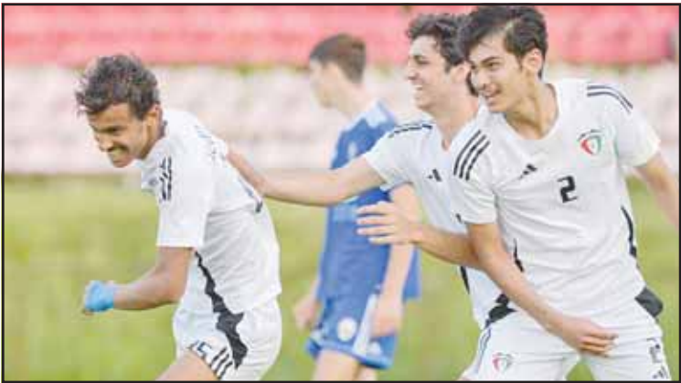
Players celebrate the opening goal.

BELGRADE, Aug 12: The Kuwait U-20 national team continued its preparations in its training camp in Serbia with a 2-0 victory over Serbian club Vozdovac in a friendly match.