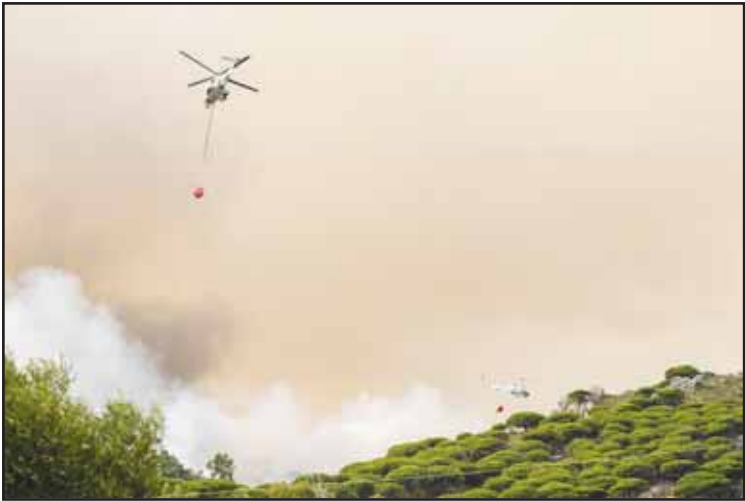
Firefighting helicopters drop water to extinguish a blaze in Torre de la Peña, southern Spain on Aug 5. (AP)

MADRID, Aug 12, (AP): Thousands of people in Spain faced evacuation orders Tuesday as wildfires continued to burn across the Iberian Peninsula during a heatwave expected to reach temperatures of 44 degrees Celsius (112.2 Fahrenheit) in some places. Firefighters had largely contained a blaze outside Madrid that broke out Monday night, authorities said Tuesday. The fire, which mainly burned scrub and grassland, killed a man who suffered burns on 98% of his body, emergency services said. The fire affected more than 1,000 hectares (2,470 acres). By Tuesday morning, authorities were allowing some residents back into their homes. Elsewhere, firefighters were battling blazes in several Spanish regions including Castile and Leon, Castile-La Mancha, Andalusia and Galicia. Numerous fires forced thousands of people to evacuate, including holiday-goers in Cadiz after a fire sent huge plumes of smoke into the air visible Monday from some beaches at the southern tip of Spain. More than 700 firefighters in Portugal were working to control a fire in