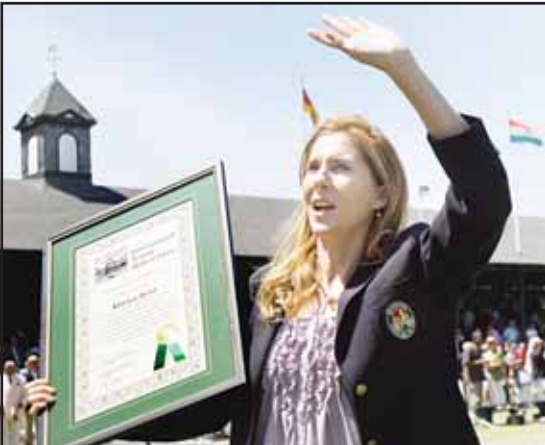
International Tennis Hall of Fame inductee Monica Seles waves to the crowd as she holds her plaque during ceremonies in Newport, R.I., July 11, 2009.

who is partnering with argenx, an immunology company headquartered in the Netherlands, to promote their Go for Greater campaign. "So this is where - I can't emphasize enough - I wish I had somebody like me speak up about it." It's been three decades since Seles returned to competition at the 1995 U.S. Open, making it to the final, more than two years after she was attacked by a man with a knife at a tournament in Hamburg, Germany.