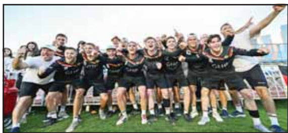
Members of team Germany celebrate victory after the Fistball Men's Semifinal Match between Germany and Austria at The World Games 2025 in Chengdu, southwest China's Sichuan Province.