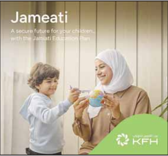
KFH's Jameati investment plan.

To benefit from this long-term investment plan, the child must be no older than 14 years, and the customer's age must be between 21 and 61 years. The investment term ranges from 4 to 18 years. By the time the child reaches university age, the accumulated savings and profits will be available to cover all university education ex-