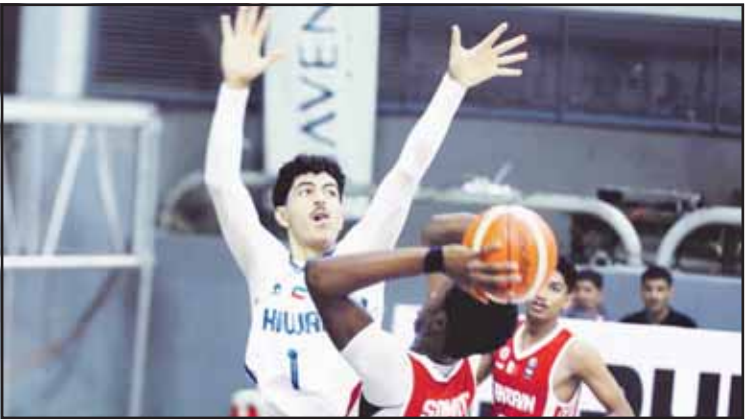
A Kuwaiti player defends as an opponent goes for the basket.