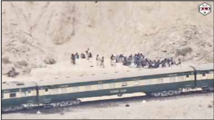
In this frame grab from a video released by the Baluchistan Liberation Army shows people outside the a train after being attacked by the BLA on its transit from Quetta to the northern city of Peshawar, in Bolan district, Pakistan’s southwestern Balochistan province, March 12. (AP)

ISLAMABAD, Aug 12, (AP): Pakistani officials on Tuesday welcomed a move by the US State Department to designate a Pakistani separatist group as a foreign terrorist organization. The designation of the Baluchistan Liberation Army and its fighting wing, the Majeed Brigade, blamed for deadly attacks in Balochistan province, coincides with a visit to the US by Pakistan’s army chief Field Marshal Asim Munir. The announcement comes less than two weeks after Washington and Islamabad reached a trade agreement expected to allow US firms to help develop Pakistan’s largely untapped oil reserves in resource-rich Balochistan and lower trade tariffs for Islamabad. Pakistan’s Ministry of Foreign Affairs welcomed the designation Tuesday, noting that the BLA was banned at home in 2024. “Pakistan remains a steadfast bulwark against terrorism. Our sacrifices have secured critical counterterrorism successes, not only for the country, but for regional stability and global security,” it said in a statement. Also: KHAR, Pakistan: Pakistani security