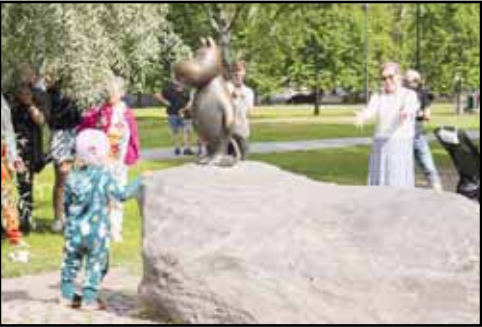
Finland Moomins Fans celebrate the 80th anniversary of the publication of the Finnish children's classic, 'The Moomins and The Great Flood,' and the birthday of the author Tove Jansson, in Tampere, Finland, Saturday, Aug. 9.

The Senns also made an Instagram page docu-