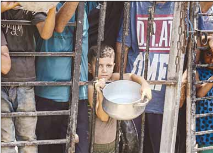
Displaced Palestinians wait to get free food in the west of Gaza City, on Aug. 10.

warned that only 1.5 percent of cropland in Gaza is both accessible and undamaged, signaling a near-total collapse of the local food system. Ramesh Rajasingham, director of OCHA's Coordination Division, in a rare Sunday UN Security Council session, described humanitarian conditions in Gaza as "beyond horrific." He also expressed deep concern over the prolonged conflict and reports of atrocities and a further human toll that is likely to unfold following Israel's decision to expand military operations in Gaza, calling it a "grave escalation in a conflict that has already inflicted unimaginable suffering." Rajasingham said that whatever lifelines remain in Gaza are collapsing under the weight of sustained hostilities, forced displacement, and insufficient levels of life-saving aid.