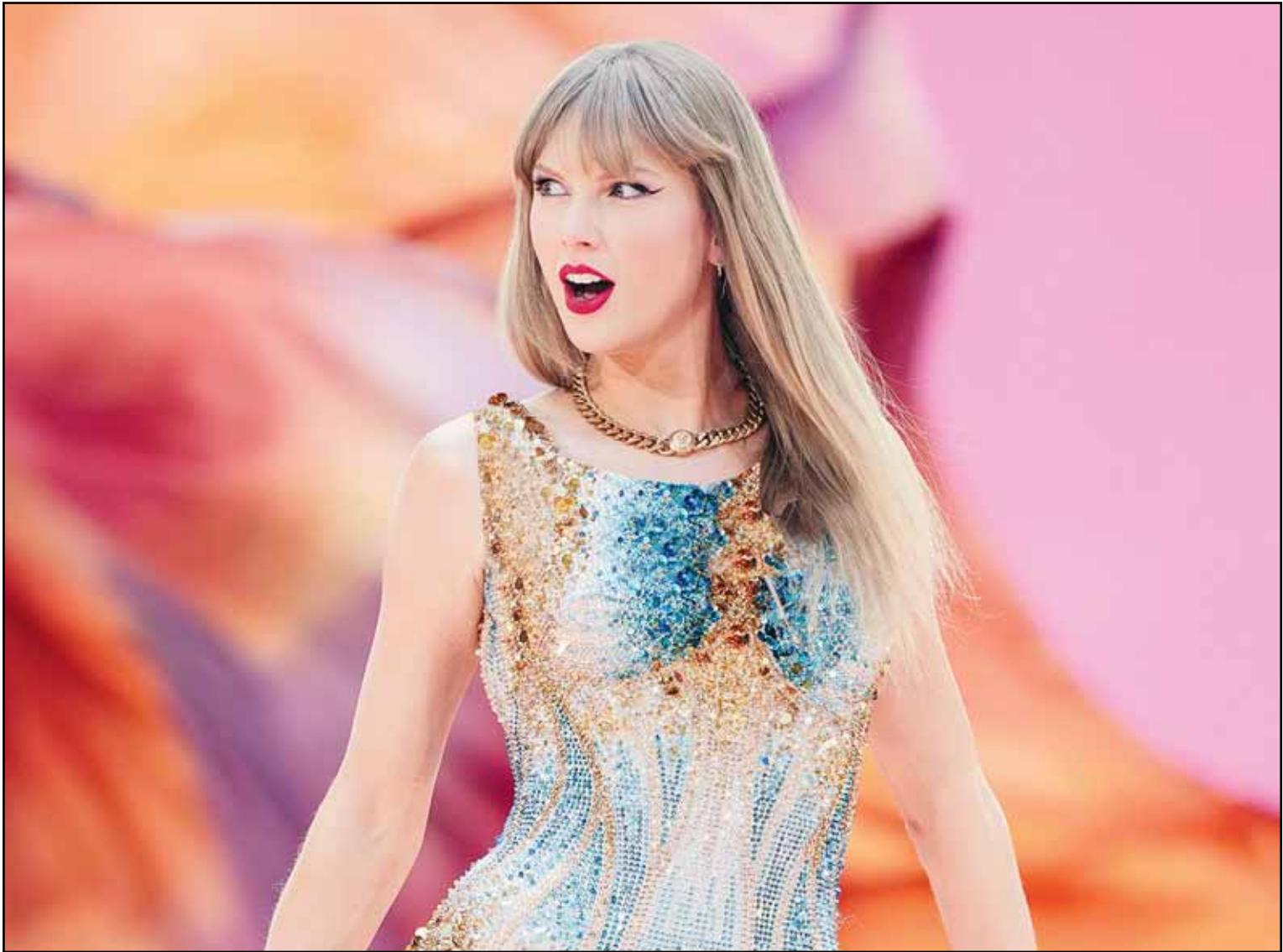
Taylor Swift performs at Wembley Stadium as part of her Eras Tour June 21, 2024, in London.