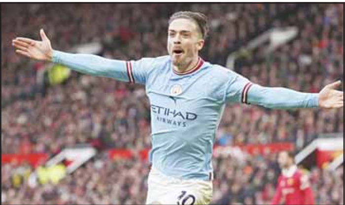
In this file photo, Manchester City’s Jack Grealish celebrates after scoring during Premier League game between City and Manchester United at Old Trafford.

Bundesliga games will take longer this season as Germany joins a drive to calculate added time more precisely.