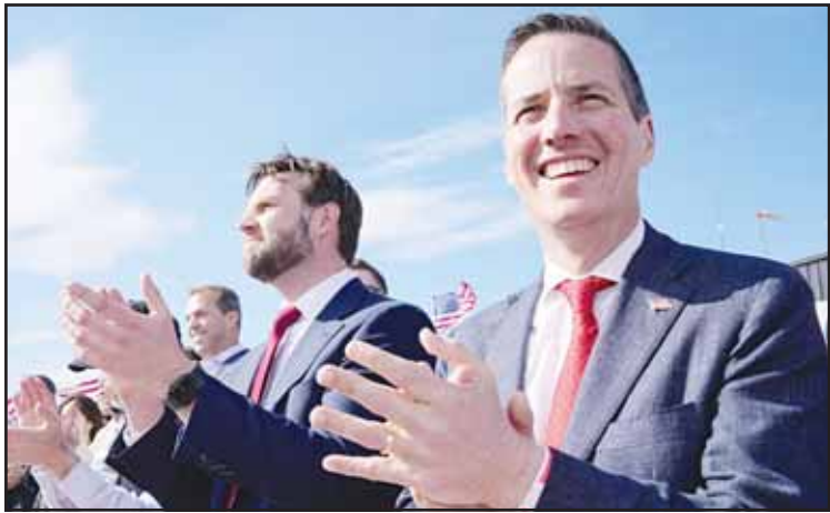
US Sen JD Vance, (center), and Senate candidate Bernie Moreno, (right), applaud as Republican presidential candidate and former President Donald Trump speaks at a campaign rally in Vandalia, Ohio on March 16, 2024.

MIAMI, Aug 12, When Republican Sen Bernie Moreno visits Colombia this week as part of a three-nation tour of Latin America, it will be something of a homecoming. Ohio’s first Latino senator, who defeated an incumbent last year with the help of Donald Trump’s endorsement, was born in the Colombian capital of Bogota, and even as he was chasing the American dream, he kept close tabs on the country through older brothers who are heavyweights in politics and business there. Moreno, 58, has emerged as an interlocutor for conservatives in Latin America seeking to connect with the Trump administration. In an interview with The Associated Press ahead of the trip, he expressed deep concern about Colombia’s direction under left-wing President Gustavo Petro and suggested that US sanctions, higher tariffs or other retaliatory action might be needed to steer it straight. The recent criminal conviction of former President Alvaro Uribe, a con