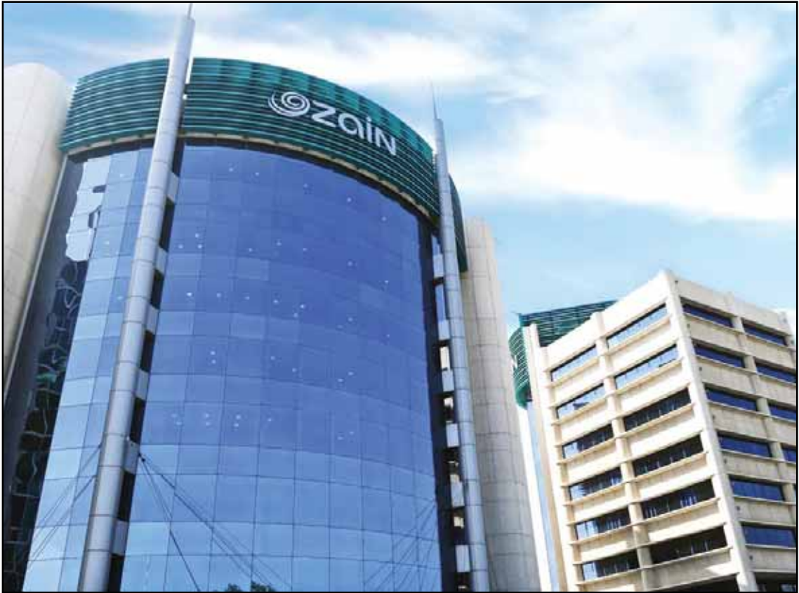
Zain Group HQ

Bahrain: Revenue for the quarter grew 7% to reach USD 54 million.EBITDA reached USD 15million, reflecting an EBITDA margin of 28%. Net income for the second quarter increased 1% to reach USD 3.6 million. For the six-month period, net income grew 5% to reach USD 6.7 million), data revenue grew by 5% to represent 45% of total revenue.