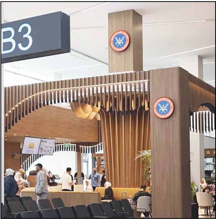
Kuwait Flour Mills outlet at Terminal 4.

banking experience to our customers, even while they travel. This partnership also aligns with our focus on supporting local projects and fostering partnerships between the public and private sectors. We firmly believe in the importance of boosting the local economy and supporting the growth and development of Kuwaiti companies, which we continue to pursue through our various initiatives." Warba Bank's Commitment to Innovation and Excellence Warba Bank continues to lead the way in providing innovative digital services and exclusive offers that strengthen its position as a modern Islamic banking institution. The Bank aims to create a banking experience rooted in genuine engagement with customers' needs and aspirations, in line with its slogan, "Let's Own Tomorrow." Warba Bank has achieved remarkable success in a short period, securing a leading position in Islamic digital banking in Kuwait. It is among the local banks with the largest shareholder base, making it close to all segments of society. This achievement further reaffirms the Bank's position as a trusted banking partner that combines innovation and social responsibility in delivering best-in-class financial products and services.