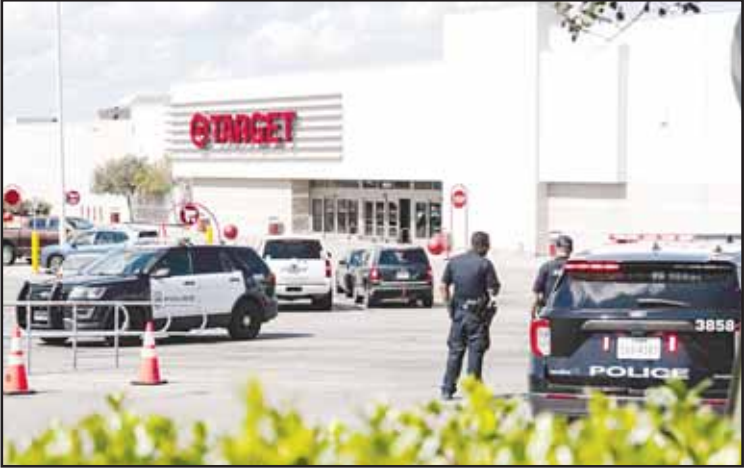
Law enforcement investigates a fatal shooting at Target off Research Boulevard, in Austin, Texas, Monday, Aug 11.