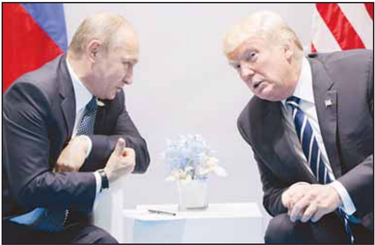
US President Donald Trump meets with Russian President Vladimir Putin at the G-20 Summit on July 7, 2017, in Hamburg, Germany.

BRUSSELS, Aug 12, European Union leaders appealed on Tuesday to US President Donald Trump to defend their security interests at a key summit with his Russian counterpart Vladimir Putin later this week over the war in Ukraine. Putin appeared to be on the verge of making a key territorial grab ahead of Friday's summit, potentially to use as leverage in any peace negotiations. The Europeans are desperate to exert some influence over the meeting from which they have been sidelined. It remains unclear whether even Ukraine will take part. Trump has said that he wants to see whether Putin is serious about ending the war, now in its fourth year. But Trump has disappointed US allies in Europe by saying that Ukraine will have to give up some Russian-held territory. He also said that Russia must accept land swaps, although it remains unclear what Putin might be expected to surrender. The Europeans and Ukraine are wary that Putin, who has waged the biggest land war in Europe since 1945 and used Russia's energy might to try to cow the EU, might secure favorable concessions and set the outlines of a peace deal without them. The overarching fear for European countries is that Putin will set his sights on one of them next if he wins in Ukraine. In a statement early on Tuesday, the leaders said that they "welcome