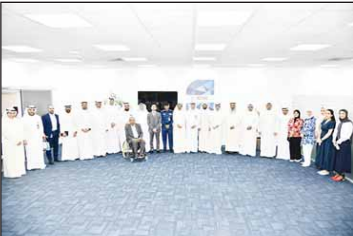
Group photo during the inauguration.