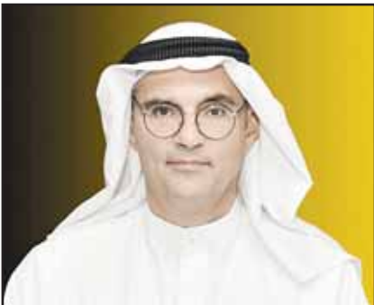
Tarek Sultan, Agility Global Chairman

Tristar, a fully integrated fuel logistics business, reported Q2 revenue of $346 million, EBITDA of $64 million and EBIT $33 million. The 17.3% revenue growth over Q2 2024 was mainly driven by the new retail fuel business in Sri Lanka, which began operations in the second half of 2024. Although the retail fuel business is a low margin business today, Tristar is gaining a strong market presence and expects profit margins to improve in 2026 as efficiencies are realized, and the network expands. The maritime segment continued to face market headwinds during the quarter, but management remains confident in the long-term potential of this segment.