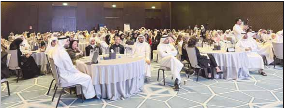
Turnout was high for the CAIT, Microsoft workshop.

He thanked all those who donated to the relief aid campaign, saying that the Kuwaiti leadership and people would always stand with the people of Palestine.