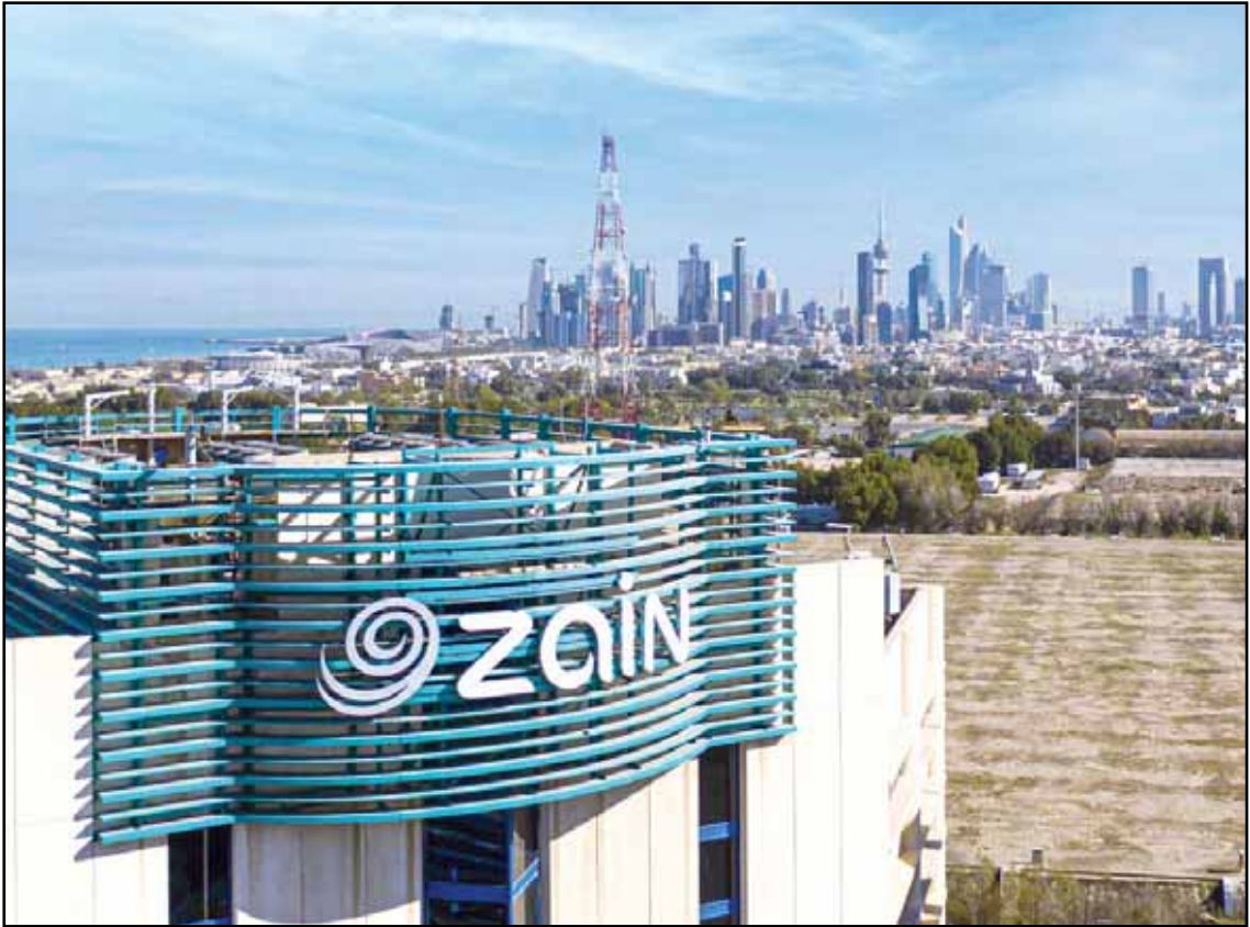
Zain HQ Building