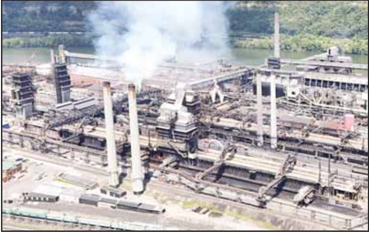
A portion of the Clairton Coke Works, a US Steel plant, is seen on Aug 11, in Clairton, Pa.