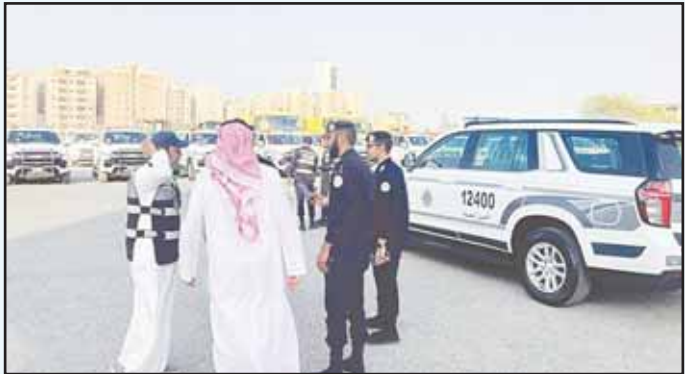
A joint police contingent before the expanded raid in Ahmadi governorate.

KUWAIT CITY, Aug 12: Six expatriates were referred to the Administrative Deportation Department and their names were included on the list of those banned from entering the country for setting up random garages on state property, reports Al-Anba daily.