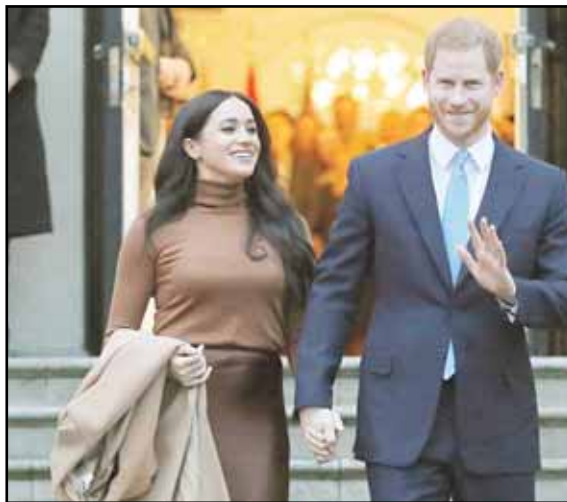
In this Jan. 7, 2020, file photo, Britain's Prince Harry and Meghan, Duchess of Sussex leave Canada House in London.

The couple have been detangling their lives from the British royal family and are living in California with their two young children.