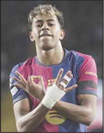
In this file photo, Barcelona’s Lamine Yamal celebrates after scoring his side’s second goal during the Champions League round of 16 second leg soccer match between FC Barcelona and SL Benfica at the Lluís Companys Olympic Stadium in Barcelona, Spain.

It all led to a coaching change, with Carlo Ancelotti taking over the Brazil job and former player Alonso arriving as widely expected.