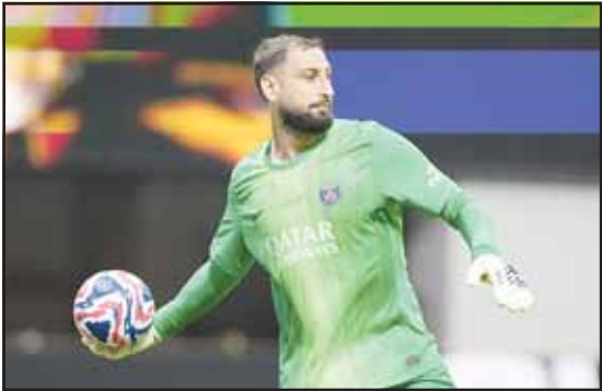
In this file photo, Paris Saint-Germain's goalkeeper Gianluigi Donnarumma puts the ball back in play during the Club World Cup round of 16 soccer match between PSG and Inter Miami in Atlanta.

pean Championship in 2021. But with one year left on his contract, Donnarumma has refused to sign a new contract and PSG is unlikely to let him leave for free at the end of the season.