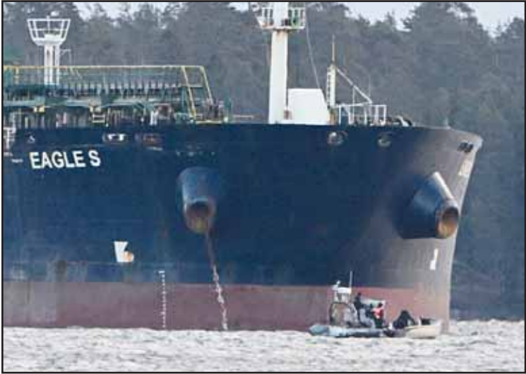
The Cook Islands-registered oil tanker Eagle S is anchored near the Kilahti port in Porvoo on the Gulf of Finland on Dec 30, 2024.

HELSINKI, Aug 12, Finnish authorities said Monday they have charged the captain and two senior officers of a Russia-linked vessel that damaged undersea cables last year between Finland and Estonia. The Finnish deputy prosecutor general said in a statement that charges of aggravated criminal mischief and aggravated interference with communications were filed against the captain and first and second officers of the Eagle S oil tanker. Their names were not made public. The statement said they denied the allegations. Authorities have said the vessel dragged its anchor to damage the Estlink-2 power cable and communication links between Finland and Estonia on Dec. 25. The Kremlin previously denied involvement in damaging the infrastructure, which provides power and communication for thousands of Europeans. The Eagle S is flagged in the Cook Islands but has been described by Finnish customs officials and the European Union's executive commission as part of Russia's shadow fleet of fuel tankers. Those are aging vessels with obscure ownership, acquired to evade Western sanctions amid the war in