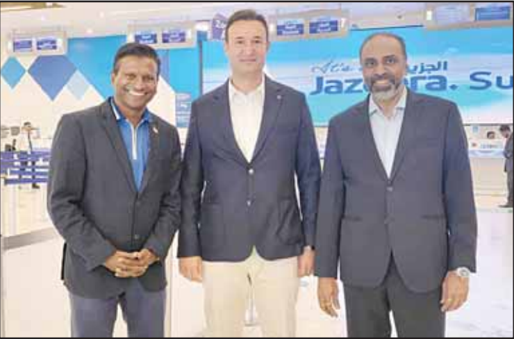
New GM Jazeera Terminal 5

generation facilities to support the future of travel in Kuwait. These projects will progressively raise total passenger capacity from 5 million to 7.5 million, and eventually to 12 million, while aligning with Kuwait’s vision for a world-class aviation hub. Alp highlighted: “I am honored to join Jazeera Airways at this dynamic stage of growth. With the expansion of T5 and the development of T6 ahead, I look