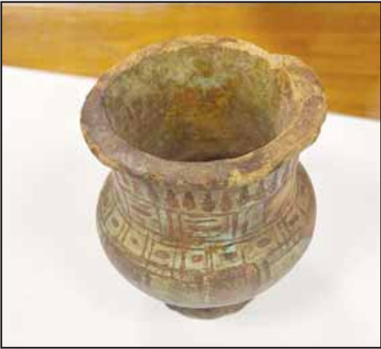
An artifact from ancient Egyptian civilization.