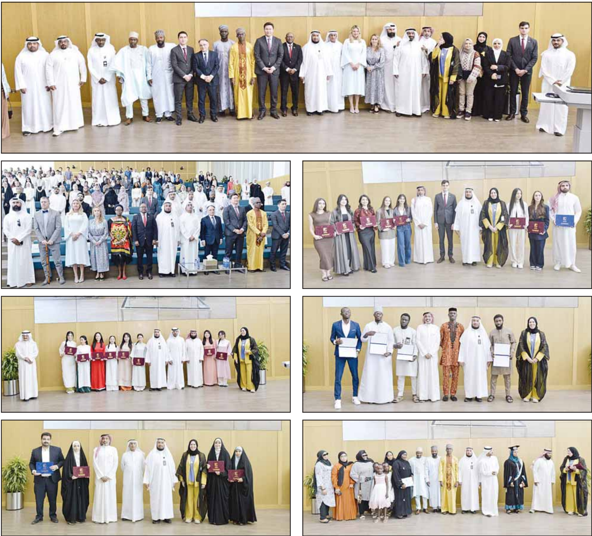
Top & above: Photos taken during the graduation ceremony, organized by the Language Center at the College of Arts in Kuwait University.