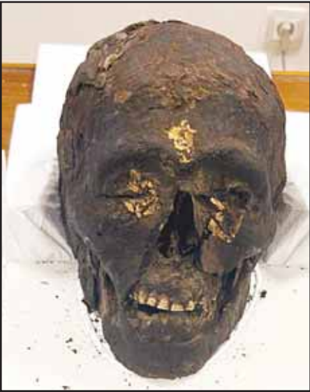
A skull from the Egyptian artifacts recovered from the United Kingdom and Germany.

Egypt has reclaimed 13 relics from the United Kingdom and Germany as part of the state’s policy to retrieve and preserve the nation’s heritage and historical treasures.