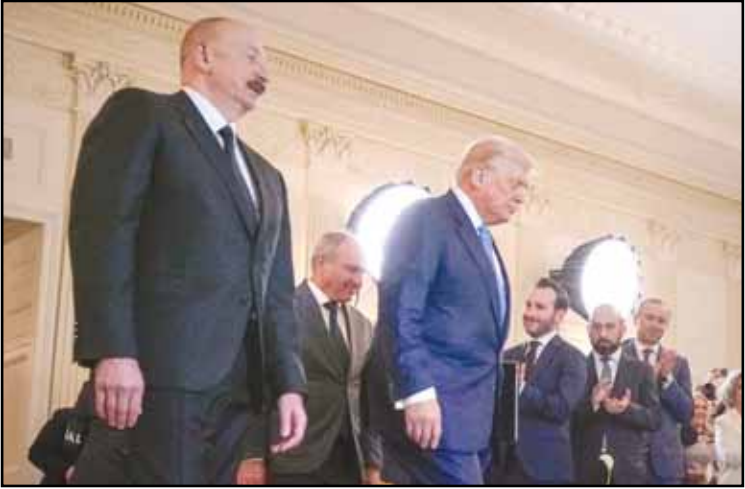
Azerbaijan’s President Ilham Aliyev, (from left), Armenian Prime Minister Nikol Pashinyan and US President Donald Trump arrive for a trilateral signing ceremony in the State Dining Room of the White House on Aug 8 in Washington.

heart of the Armenia-Azerbaijan conflict since the Soviet Union’s collapse. Although internationally recognized as part of Azerbaijan, the mountainous region was controlled for decades by ethnic Armenian forces backed by Armenia. Two wars - in the early 1990s and again in 2020 - left tens of thousands dead and displaced. In 2023, Azerbaijan regained control of most of the terri-