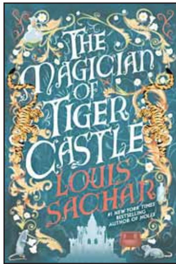
This cover image released by Ace shows 'The Magician of Tiger Castle' by Louis Sachar.

Though it's classified as an adult novel, "The Magician of Tiger