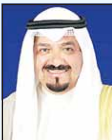
HH the Prime Minister