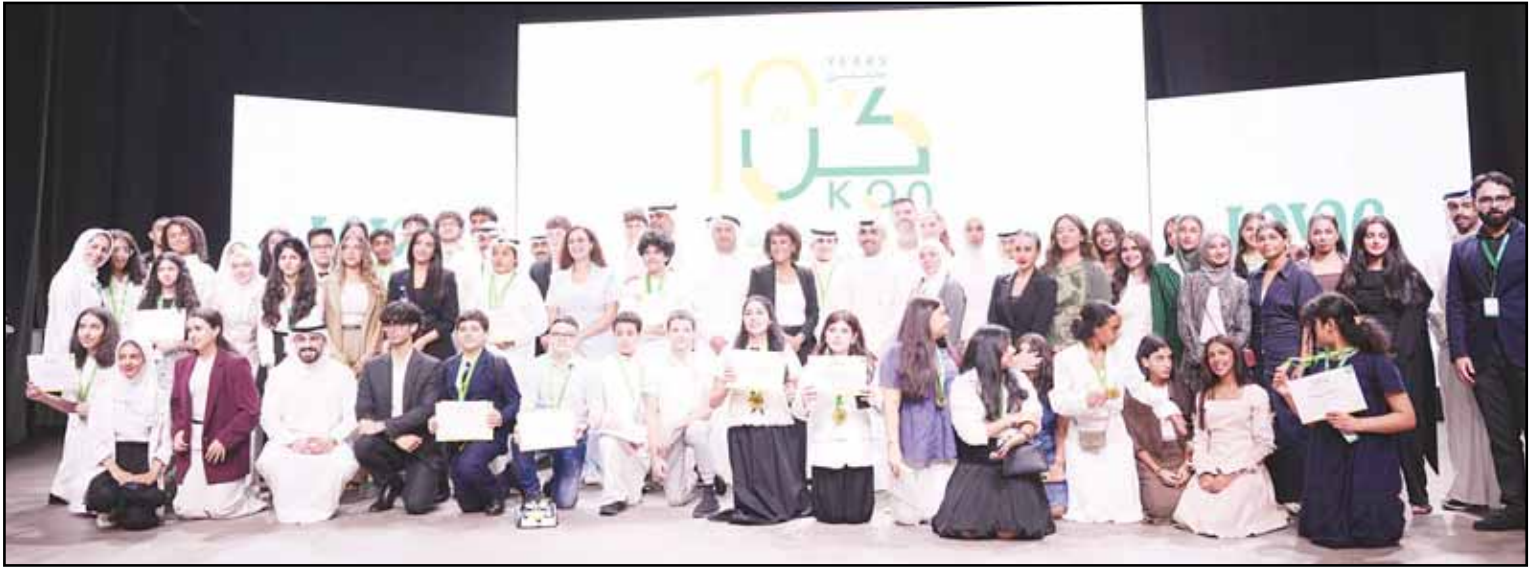
NBK, LOYAC empower youth through social innovation.