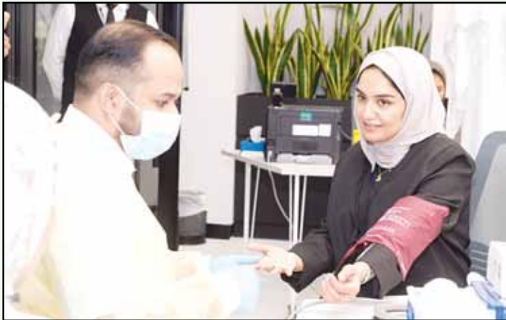
Burgan employees taking part in the blood drive.