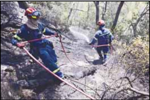
Two firefighters of the Wildfire Special Operation Unit, operate after a wildfire in Charvalo village, southeast of Athens, Greece on Aug 9.

The wildfire erupted around 2 p.m. local time and quickly spread through dry grasslands, farmland, and residential areas, driven by strong winds and parched vegetation, Greece’s national broadcaster ERT reported.