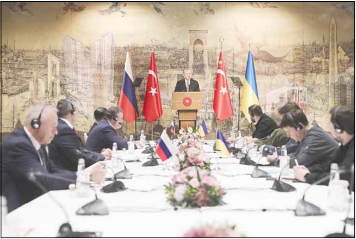
In this photo, provided by the Turkish Presidency, Turkish President Recep Tayyip Erdogan, (center), welcomes the Russian, (left), and Ukrainian delegations ahead of their talks in Istanbul on March 29, 2022.

By the time he came to Washington, at age 53, Webster had practiced law for nearly 20 years, had served a stint as a federal prosecutor and had spent almost nine years on the federal bench in his native St. Louis. Those who opposed him in court or disagreed with his rulings acknowledged that his honesty was beyond question.