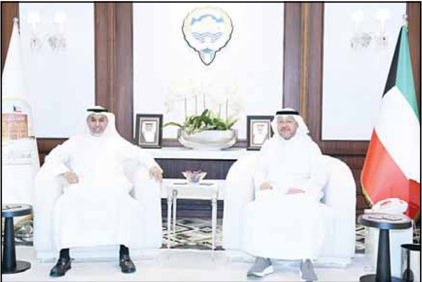
Farwaniya Governor and acting Governor of the Capital Sheikh Athbi Nasser Al-Athbi Al-Sabah meets former Minister of State for Awqaf and Islamic Affairs, Minister of State for Municipal Affairs, and Minister of State for Communications Affairs Fahad Ali Al-Shu'la.

This report is part of the WHO Science-Policy Series on Air Quality, Energy and Health; which aims to provide scientific knowledge and evidence to support decision-makers through scientific insights related to air quality, energy access, climate change and public health.