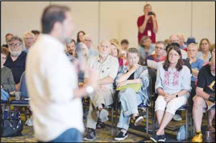
Audience members listen to Sen. Ruben Gallego, D-Ariz., speak during a town hall meeting on Aug 9, 2025, in Davenport, Iowa.

Democrat, one of several party figures who have been attacking the bill in congressional districts represented by Republicans. He was in Rep. Mariannette Miller-Meeks’ 1st Congressional District, among the most competitive