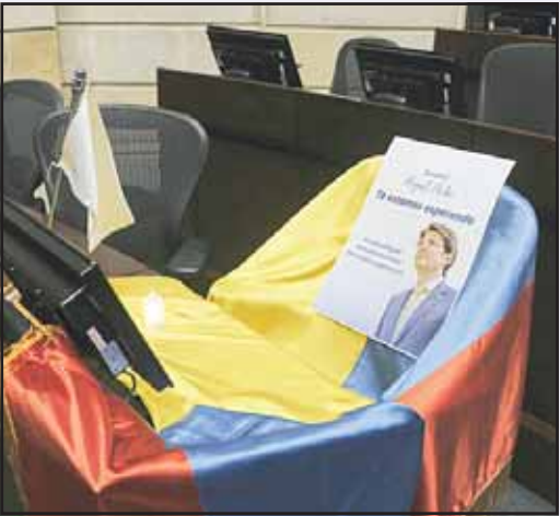
A leaflet showing Colombian Sen Miguel Uribe Turbay sits on a Colombian national flag draped over his seat in the congressional chamber in Bogotá, Colombia on June 9.