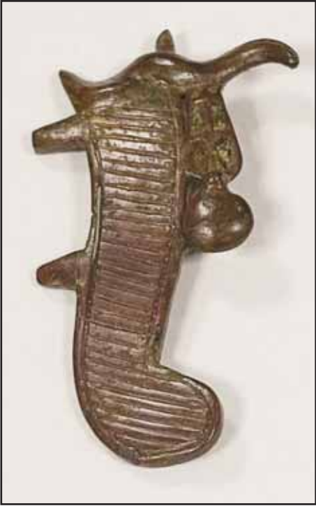
A piece of a bronze crown.