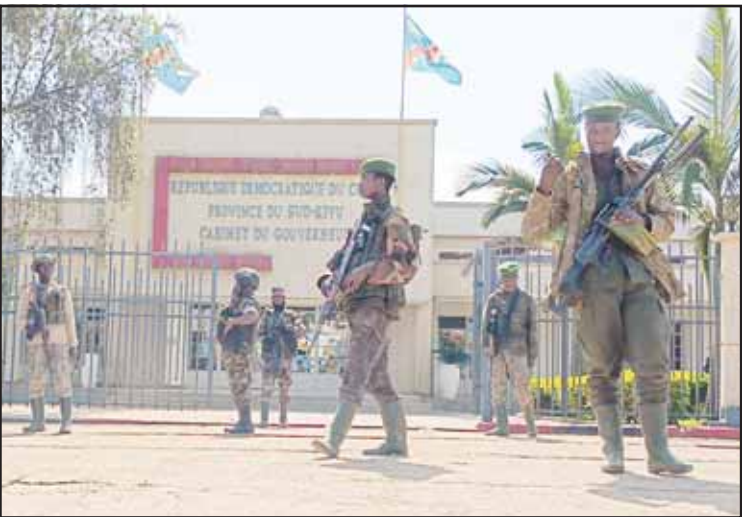
M23 rebels guard outside the South Kivu province administrative office, at the centre of east Congo’s second-largest city, Bukavu on Feb 16. (AP)

KINSHASA, Congo, Aug 10, (AP): Rwanda-backed rebels have killed at least 80 people in eastern Congo in recent weeks, Congolese authorities said, despite the ongoing Qatar-led peace process aiming to end the conflict. A decades-long conflict ravaging eastern Democratic Republic of Congo escalated earlier this year when the M23 rebel group seized two key cities with the help of neighboring Rwandan forces. Congo has long been wracked by deadly conflict in its mineral-rich east, with more than 100 armed groups active. The continuing violence could threaten the efforts to get Congo and the rebels to sign a permanent peace deal by Aug. 18 as hoped for. One of the deal’s conditions is the protection of civilians and the safe return of millions of displaced people. The Congolese army said in a statement late Friday that it is “fiercely condemning” what it described as a series of mass murders of civilians in South Kivu. It said that 80 people were killed on Aug 4 in the village of Nyaborongo, and that six civilians, including two minors, were murdered on July 24 in the village of Lumbishi. It blamed the the RDF/M23-AFC coalition, which includes the rebel groups M23 and AFC backed by the Rwanda Defense Force (RDF).