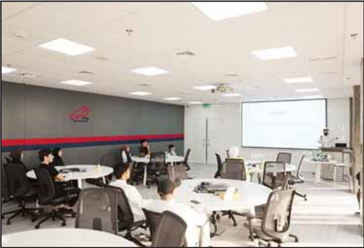
Gulf Bank, INJAZ Kuwait host AI workshop for youth.

KUWAIT CITY, Aug 10: As part of its ongoing commitment to supporting youth and equipping them with the tools of the future, Gulf Bank, in collaboration with INJAZ Kuwait, organized an interactive workshop on Artificial Intelligence (AI) and its applications, attended by a large number of school and university students. This initiative comes within Gulf Bank’s continuous efforts to support digital education and enhance technological literacy among the next generation. The workshop provided participants with an introduction to AI concepts and hands-on activities designed to develop their creative and analytical thinking skills, better preparing them for the demands of the digital job market. Through its long-standing partnership with INJAZ Kuwait, Gulf Bank continues to implement a variety of educational programs aimed at empowering youth in areas such as entrepreneurship, career readiness, and financial literacy – preparing them for professional success while fostering an entrepreneurial and independent mindset. This collaboration stands as a testament to Gulf Bank’s commitment to corporate social responsibility and investment in national talent. The Bank remains dedicated to launching and supporting innovative initiatives, in partnership with leading educational institutions like INJAZ, to provide modern learning environments that keep pace with global de-