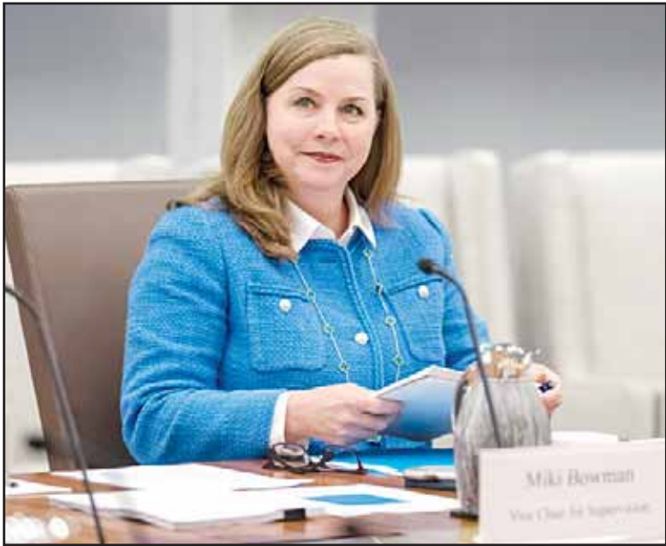
Michelle Bowman, Vice Chair for Supervision of the Federal Reserve Board of Governors, takes a seat for an open meeting of the Board of Governors at the Federal Reserve, in Washington, June 25, 2025.

man said she is getting more confident that Trump’s tariffs “will not present a persistent shock to inflation” and sees it moving closer to the Fed’s 2% target. Inflation has come down substantially since hitting a peak above 9% after the pandemic, but it has been stubbornly remaining above 2%.