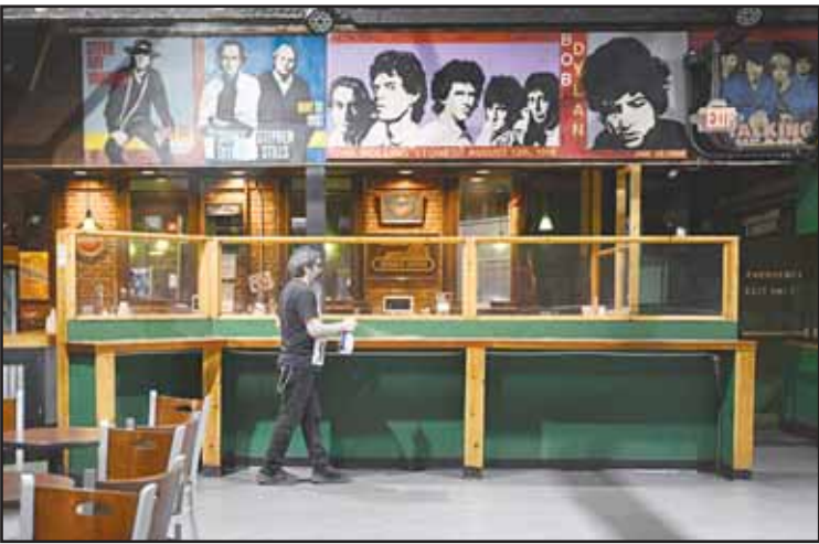
A mural of past concerts at Toad’s Place is displayed above one of the bars in New Haven, Conn., on May 9, 2025.