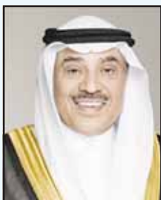
HH the Crown Prince