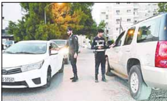
Traffic police checking the car documents.

Sheikh Humoud Al-Sabah expressed his gratitude for the minister’s visit, and highlighted the importance of this support in advancing the state’s vision for civil aviation.