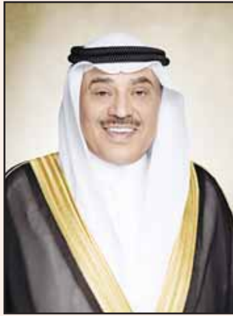
His Highness the Crown Prince

KUWAIT CITY, Aug 10, (KUNA): His Highness the Amir Sheikh Meshal Al-Ahamd Al-Jaber Al-Sabah received, Sunday, at Al-Seif Palace His Highness the Crown Prince Sheikh Sabah Khaled Al-Hamad Al-Sabah.