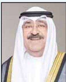
HH the Amir