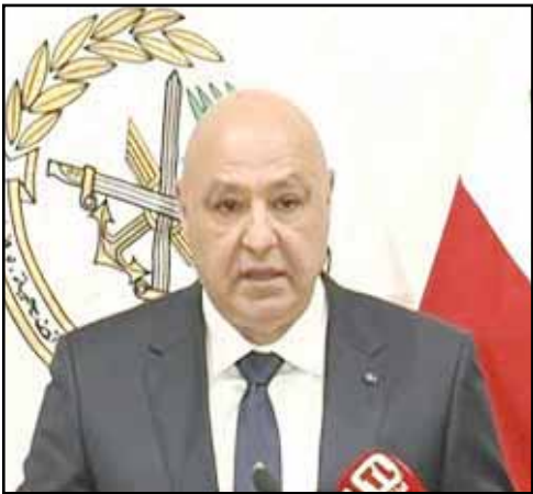
President of Lebanon, Joseph Aoun

KUWAIT CITY, Aug 10: Since President Joseph Aoun took office in January 2025, Lebanon’s economy has begun showing signs of recovery from the prolonged recession and near-total paralysis that afflicted it for years. Early official indicators point to renewed momentum in the economic reform process, driven by a return to political and institutional stability. Many local and international observers are hopeful that Lebanon’s security situation will remain stable, as this will positively impact economic reforms. President Joseph Aoun has pledged several reforms, but their success depends heavily on the cooperation and support of all parties. However, recent political tensions have raised concerns. The withdrawal of Hezbollah and Amal Movement ministers from the latest ministerial meeting in protest against placing the issue of Hezbollah’s weapons on the agenda has sparked fears of renewed political crisis after Lebanon’s slow recovery. As a result, there are growing calls for a return to calm and ministerial stability, and for all ministers to fulfill their responsibilities to ensure continued economic progress. This comes amid international expectations that Lebanon could achieve positive economic growth rates by the end of 2025. However, concerns persist among observers about the risk of Lebanon slipping back into economic decline, particularly given the country’s long-standing struggles with widespread corruption, financial mismanagement, and money laundering.