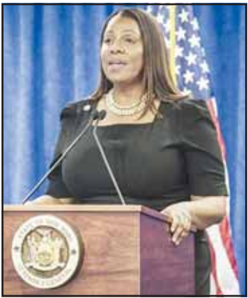
New York Attorney General Letitia James speaks on Feb 16, 2024, in New York.

rious yet the Justice Department has taken against political foes of the president, who vowed on the campaign trail to seek retribution against his opponents. Schiff and James are both vocal critics of Trump, and James has sued Trump and his Republican administration dozens of times over his policies as president and over how he conducted his private business empire. News of the subpoenas comes as the Justice Department advances an