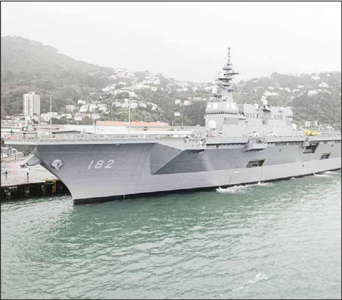
Two ships from the Japan Maritime Self-Defense Force, JS Ise and destroyer JS Suzunami tied up in the port of Wellington, New Zealand to begin a three-day ceremonial port visit on Aug 8.

the South Pacific Ocean. Two destroyers with more than 500 crew on board sailed into Wellington harbor accompanied by the New Zealand navy ship HMNZS Canterbury. The JS Ise and destroyer JS Suzunami were on an Indo-Pacific deployment and arrived from Sydney, where Japan’s military took part this month in war games involving New Zealand, Australia and other countries. The Wellington visit was a ceremonial one, but it came as Japan, whose only treaty ally is the United States, has increasingly sought to deepen bilateral military cooperation amid ongoing regional tensions. “Our defense force are developing cooperative work, not only with New Zealand and Australia but also many Pacific Island countries,” Japan’s envoy to Wellington, Makoto Osawa, told reporters Friday. “Our main goal is the free and open Indo-Pacific.” The ambassador’s remarks followed the announcement Tuesday by Australia’s government that Japanese firm Mitsubishi Heavy Industries had won the bid for a contract to build Australian warships, beating out a German firm. While officials in Canberra said the Japanese proposal was the best and cheapest, they also hailed it as the biggest defense industry agreement between the countries.