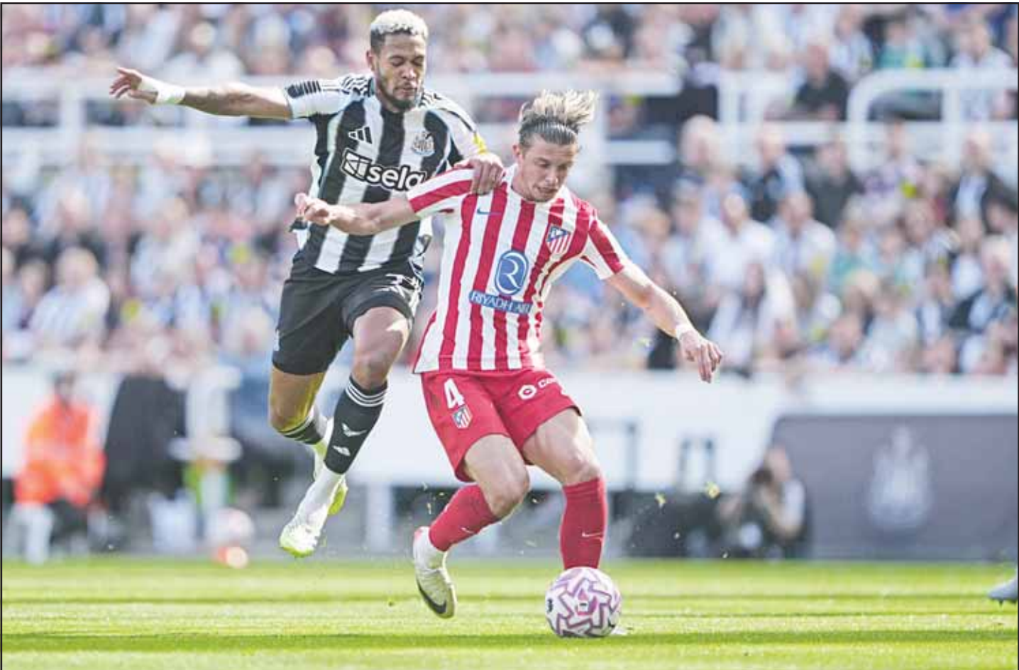
Newcastle United’s Joelinton, left, and Atletico Madrid’s Conor Gallagher battle for the ball during the Sela Cup soccer match between Newcastle United and Atletico Madrid at St. James’ Park, Newcastle, England.