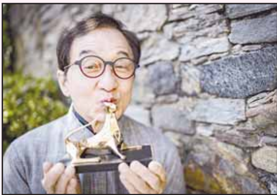
Hong Kong actor Jackie Chan poses with the 'Pardo alla Carriera' prize during the 78th Locarno International Film Festival, in Ascona near Locarno, Switzerland, Friday, Aug. 8.

Notably, 2025 marks the 80th anniversary of the victory in the Chinese People's War of Resistance Against Japanese Aggression and the World Anti-Fascist War. Several films related to this history have been released or are scheduled to premiere soon.