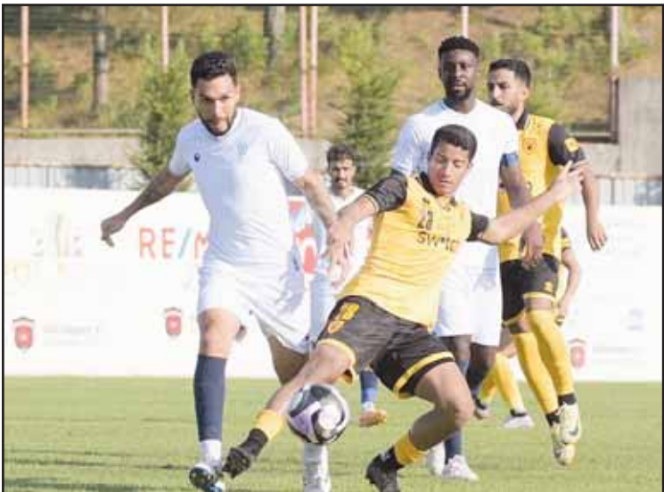
Al-Qadsiya and Al-Akhdood players battling for the ball.