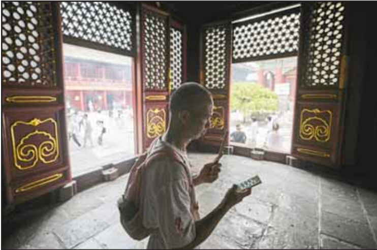
A worshipper holding incense sticks browses his phone as he tours a Tibetan monks' prayer hall at the Yonghegong Lama Temple, in Beijing, Tuesday, Aug. 5.