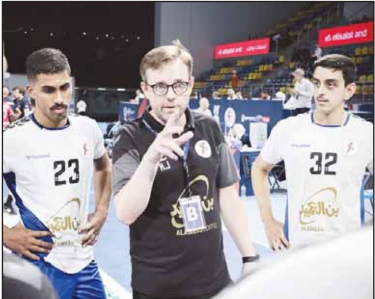
Head coach talks to the players during recess.