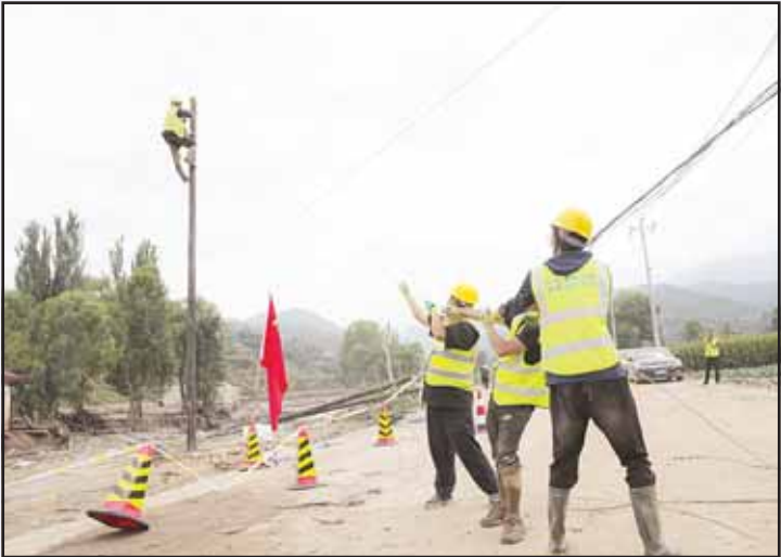
Workers repair a communication facility in Nanbeiguan Village of Yuzhong County, northwest China’s Gansu Province on Aug 9.

Roads, power restored in NW China county: Roads damaged by mountain torrents in Yuzhong County, northwest China’s Gansu Province, reopened on Sunday and power supply has been restored following the disaster that left 13 dead and 30 missing. According to transport authorities in the provincial capital Lanzhou, which administers Yuzhong, roads leading to the most affected areas reopened on Sunday. The effort involved more than 700 rescuers and over 200 machines and vehicles. Power was restored to residents affected by the disaster on Saturday night, according to the State Grid Gansu Electric Power Company. A total of 73 rescue vehicles, 42 generators and three power-generating vehicles, together with 330 repair