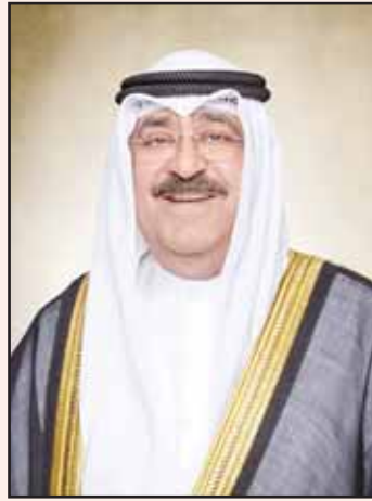
His Highness the Amir