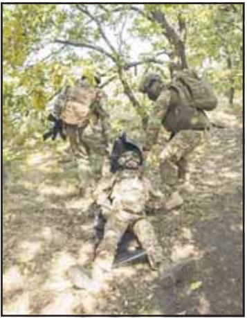
Ukrainian National Guard servicemen of 3rd brigade ‘Spartan’ carry their comrade on stretcher during a training not far from the frontline on Pokrovsk direction, Ukraine, on Aug 8.

The Trump-Putin meeting may prove pivotal in a war that began when