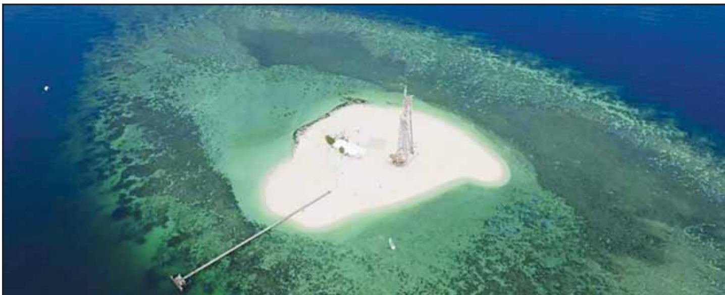
An aerial view of Kuwait’s Qaruh Island.

— Compiled by Mohammad Wangengi/Simi K. Kutty