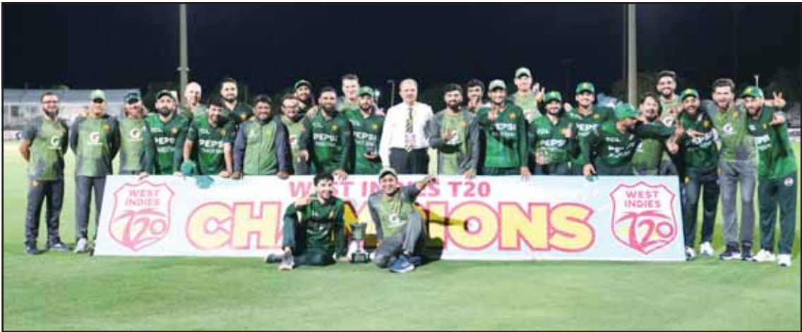
The Pakistan team poses with the trophy after winning the Twenty20 cricket series against the West Indies in Lauderhill, Fla.

deliveries) caught by Hasan Ali in the fifth over with the total at 44. Alick Athanaze scored 60 from 40 deliveries, sharing further partnerships of 30 with Hope (7) and 36 with Rutherford until he mis-timed a fuller, faster delivery from Ayub and was caught at short thirdman. At that point, West Indies slipped to 110-3 in the 13th over. Rutherford kept West Indies in the contest with 51 from 35 balls but his dismissal in the last over ended any chance of a comeback win. The series was tied 1-1 going into the decider after Jason Holder took four wickets and then smashed a boundary off the final ball of the second game to lift West Indies to a thrilling two-wicket victory on Saturday. It was the first T20 victory for West Indies in seven matches, a span that included a heavy 5-0 series defeat to Australia, on top of a test series sweep last month. Pakistan won the series-opener by 14 runs. Both teams travel to the Caribbean for a series of three one-day internationals.