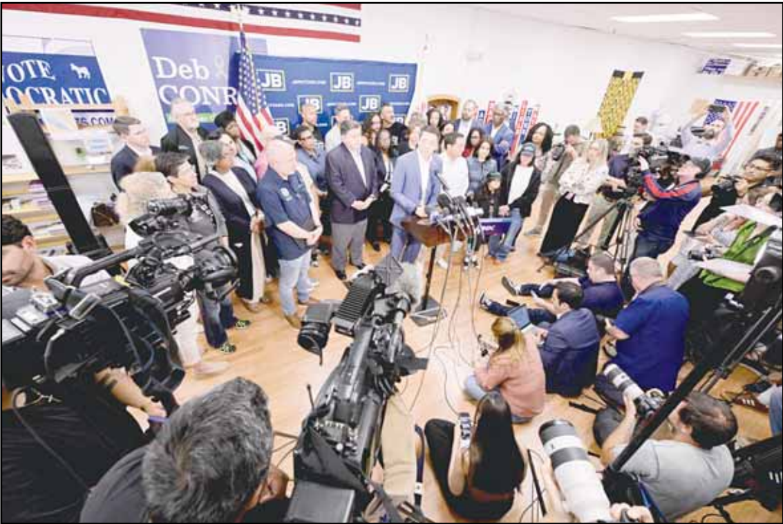
Texas House Democratic Caucus Chair Gene Wu along with other members of the Texas House are joined by Illinois Governor JB Pritzker as they speak about Texas Republican plans to redraw the House map office during a press conference at the Democratic Party of DuPage County office in Carol Stream, Illinois on Aug 3.