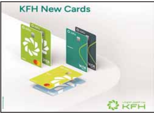
KFH card offers convenience and security with innovative payment experience.

distinguished and seamless payment experience that is both easy and secure. In addition to the flexible payment options customized according to customers' needs, whether for online shopping, bill payments, or in-store purchases, the card has broader environmental and social impacts. These include reducing plastic waste and eliminating paper usage. It also contributes to lower carbon emissions by reducing in-person card delivery.