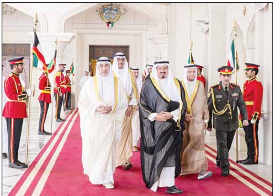
HH the PM seen off at the airport by state officials.