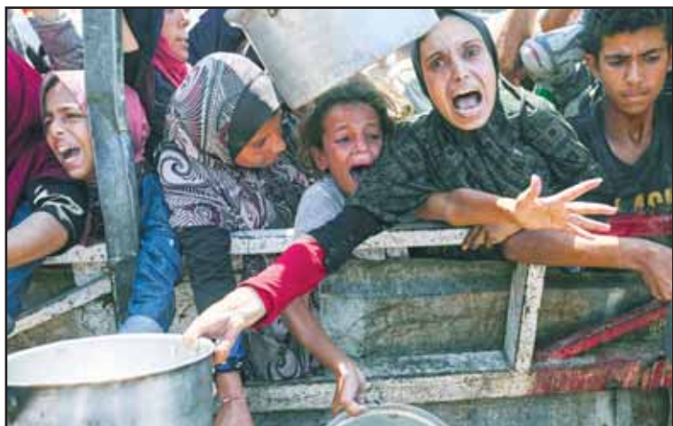
Palestinians struggle to get donated food at a community kitchen in Gaza City, northern Gaza Strip, Monday, Aug. 4, 2025.