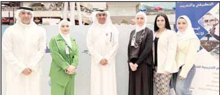
PAAET director general with stakeholders during the public awareness drive.