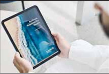
Kamco Invest Sustainability Report.

Mulla-Hussain: Our focus on sustainable growth is rooted in responsible actions, disciplined execution, and commitment to long-term value.