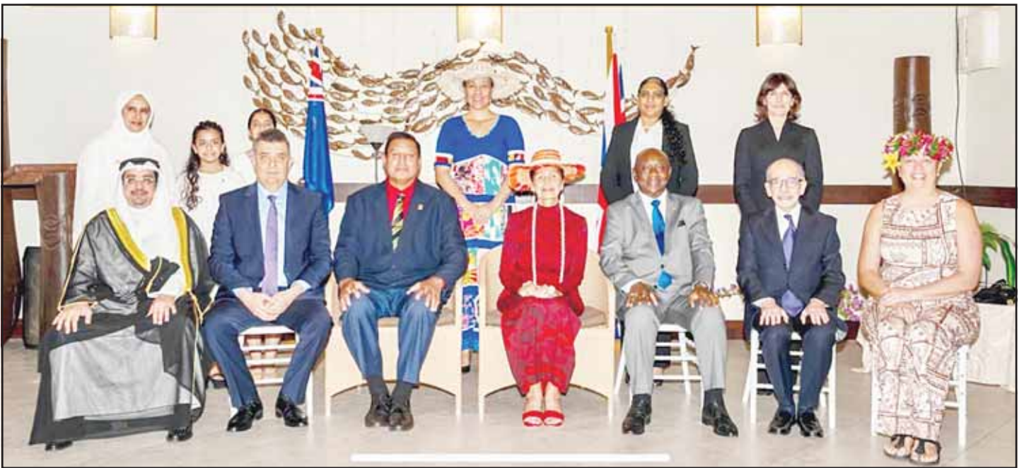
Ambassador of Kuwait to New Zealand Sheikh Sabah Nasser Al-Malek Al-Sabah and officials representing the Cook Island's King.