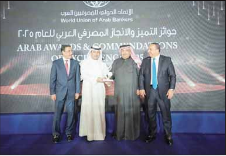
KIB earns 'Excellence in Digital Leadership' award.