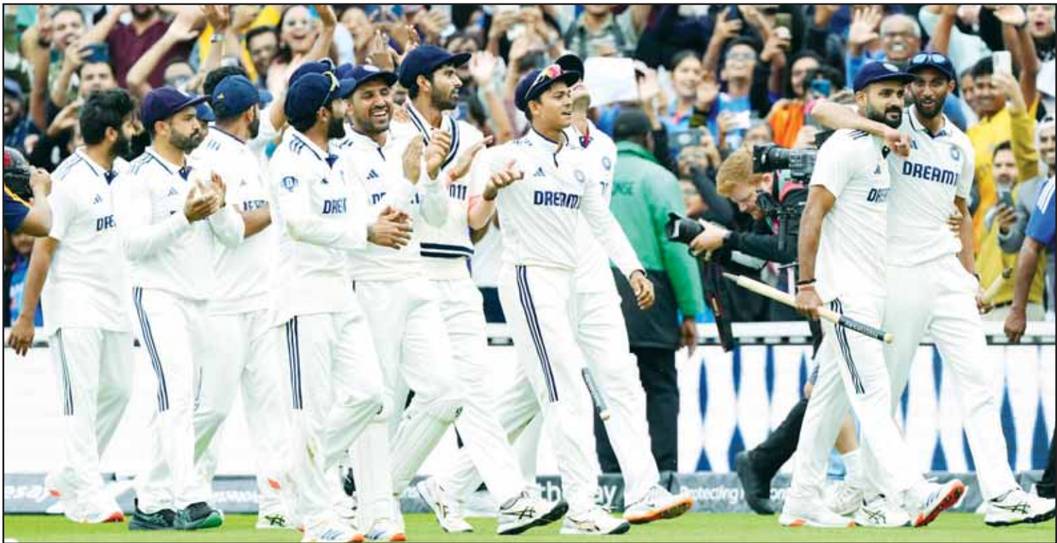
India's players celebrate their win against England on day five of the fifth cricket test match between England and India at The Kia Oval in London.