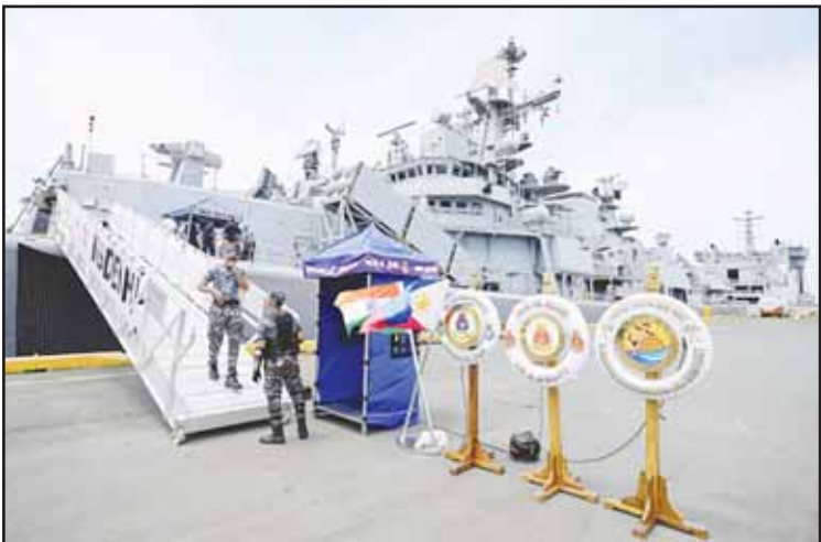
A crew disembarks the Indian navy ship guided-missile destroyer, INS Delhi, that is docked at Manila’s port, Philippines, on Aug 1.