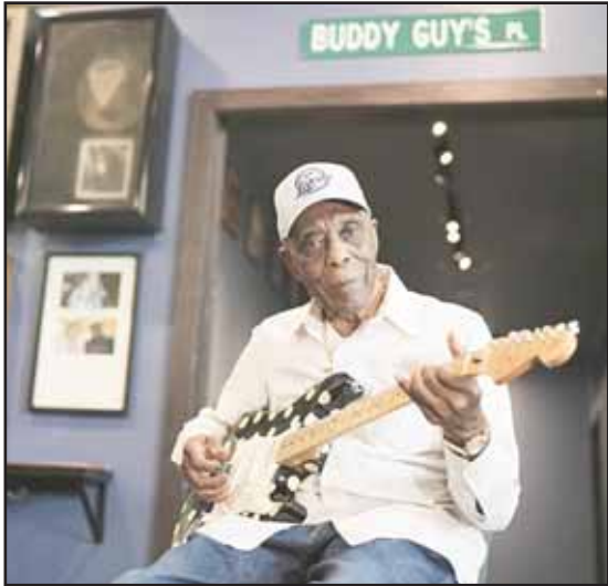
Buddy Guy poses for a portrait at Buddy Guy’s Legends in Chicago on Thursday, July 24, 2025.

“Together,” a Neon released in theaters, is rated R by the Motion Picture Association for “language, graphic nudity, brief drug content, sexual content, violent and disturbing content.” Running time: 102 minutes. Three stars out of four.