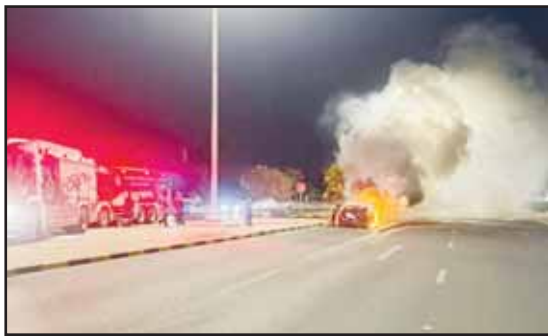
A car catches fire on a road in Salwa area.

He asserted that the third national campaign to pay debts embodies the State of Kuwait's commitment to the values of compassion, responsibility and solidarity.