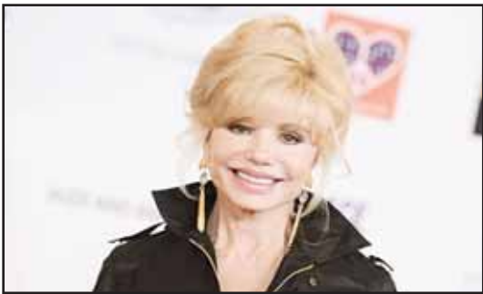
Loni Anderson arrives at the 22nd Annual Race To Erase MS Event held at the Hyatt Regency Century Plaza Hotel, April 24, 2015, in Los Angeles. The role earned Anderson two Emmy Award nominations and three Golden Globe nominations. Anderson starred on the big screen alongside Burt Reynolds in the 1983 comedy “Stroker Ace,” and the two later married and became tabloid fixtures before their messy breakup in 1994.