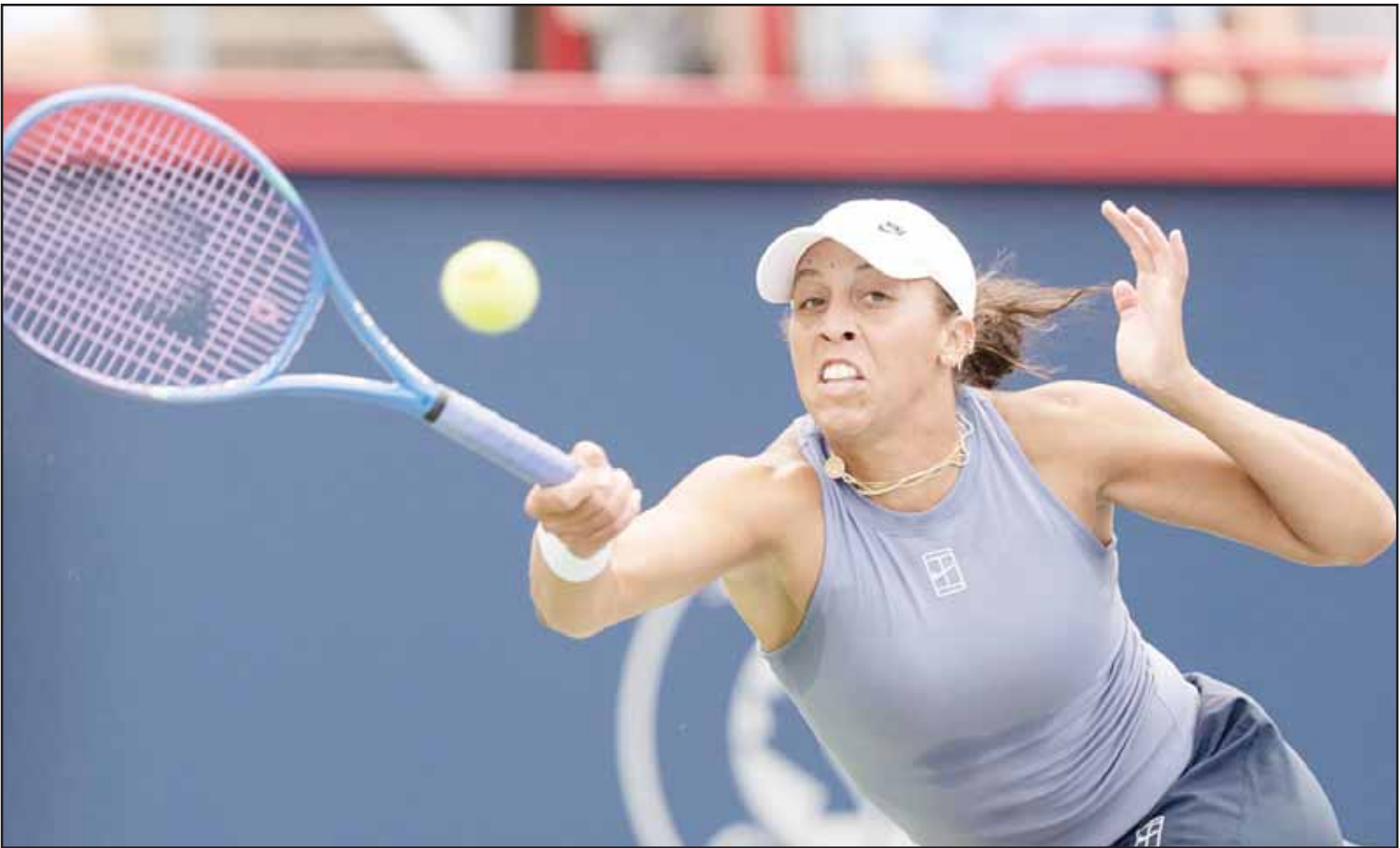
Madison Keys, of the United States, hits a return to Karolina Muchova, of Czechia, during round of 16 match action at the National Bank Open women’s tennis tournament in Montreal. (AP)

MONTREAL, Aug 4, (AP): Clara Tauson of Denmark upset second-seeded Wimbledon champion Iga Swiatek of Poland 7-6 (1), 6-3 to reach the National Bank Open quarterfinals.