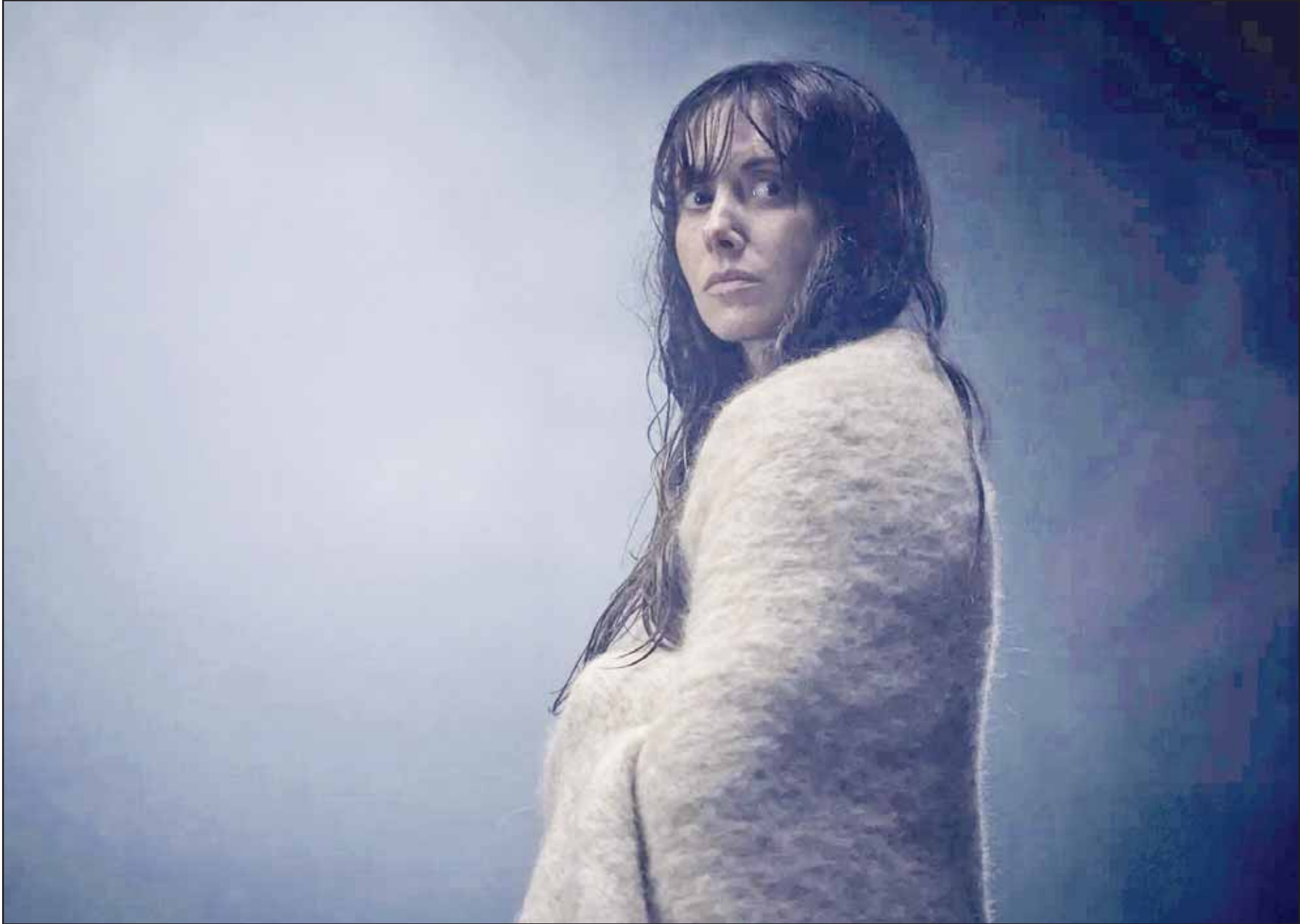
This image released by Neon shows Alison Brie in a scene from ‘Together.’

Love, codependency, and horror collide in a twisted tale