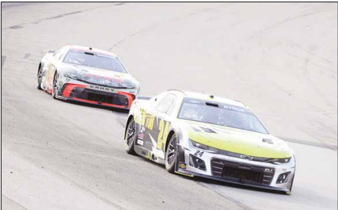
William Byron (24) holds his lead over Chase Briscoe (19) during a NASCAR Cup Series auto race at Iowa Speedway in Newton, Iowa.