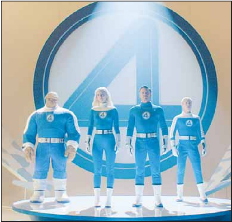
This image released by 20th Century Studios/Marvel Studios shows, from left, Ebon Moss-Bachrach as Ben Grimm/The Thing, Vanessa Kirby as Sue Storm/Invisible Woman, Pedro Pascal as Reed Richards/Mister Fantastic and Joseph Quinn as Johnny Storm/Human Torch, in a scene from ‘The Fantastic Four: First Steps.’