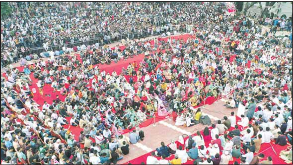
Supporters of National Citizen Party (NCP) listen to the party leader Nahid Islam during a political rally in Dhaka, Bangladesh on Aug 3.

about Manila’s plans to build up military cooperation, China’s Ministry of National Defense called the Philippines a “troublemaker” that has aligned itself with foreign forces to stir up trouble in what China deems its own territorial waters. “China never wavers in its resolve and will to safeguard national territorial sovereignty and maritime rights and interests and will take resolute countermeasures against any provocations by the Philippine side,” Defense Ministry spokesperson Col. Zhang Xiaogang said in a news conference.