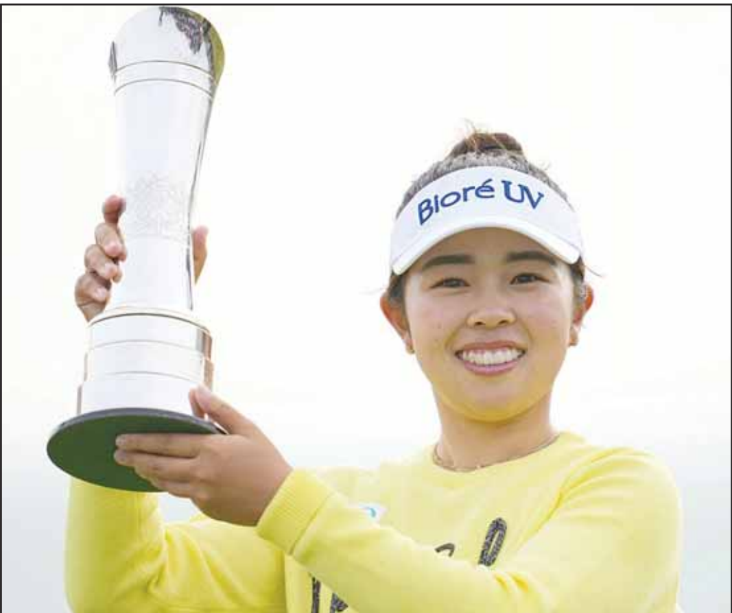
Miyu Yamashita of Japan poses with her trophy after winning the Women's British Open golf championship, at Royal Porthcawl Golf Club in Porthcawl, Wales.

Mac Meissner shot 66 to finish alone in second, worth $893,800 and