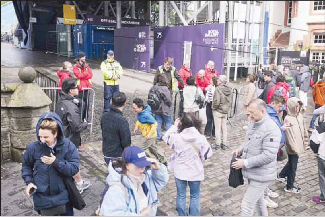
Members of the public are turned away from Edinburgh Castle as the site is closed to visitors due to high winds, in Scotland on Aug 4, as weather warnings are coming into force with Storm Floris expected to cause severe travel disruption to road, air and ferry services, and close bridges.