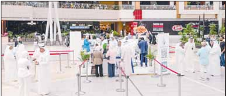
PAAET debuts new courses, promotes student awareness at Avenues Mall.