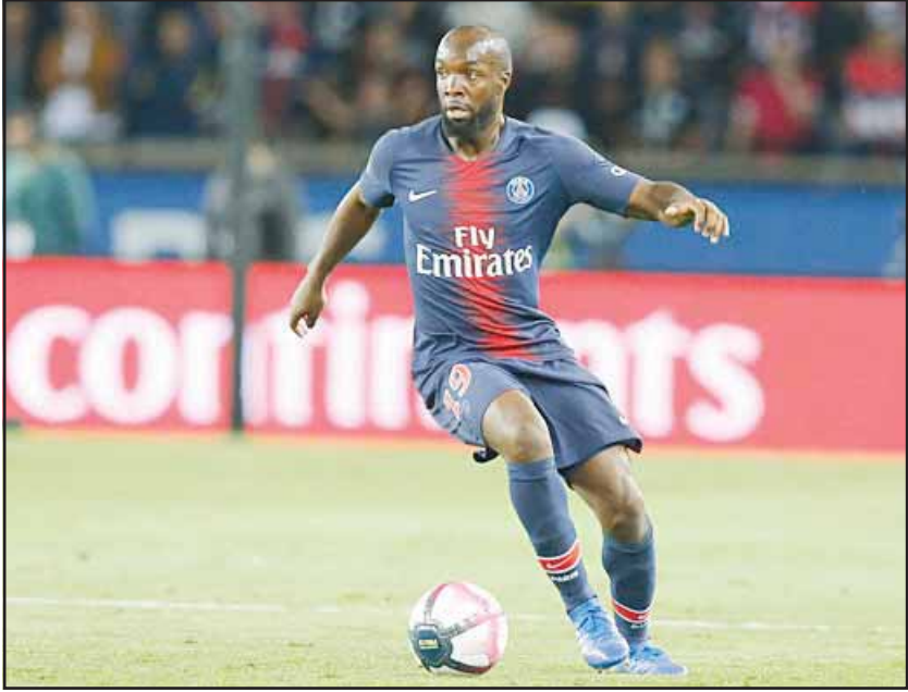
In this file photo dated Friday, Sept. 14, 2018, Paris-Saint-Germain player Lassana Diarra controls the ball during a French League One soccer match against Saint-Etienne at the Parc des Princes stadium in Paris.