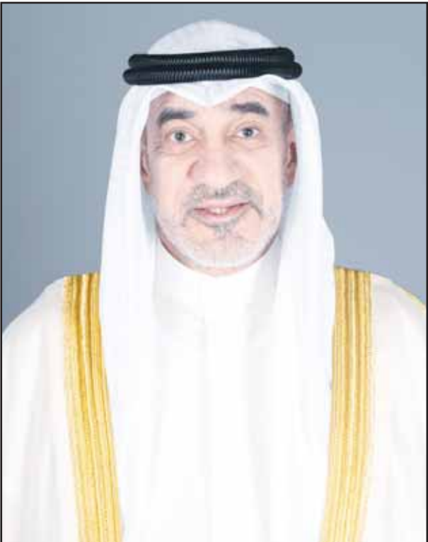
Sheikh Fahad Yousef Saud Al-Sabah, First Deputy Prime Minister and Interior Minister