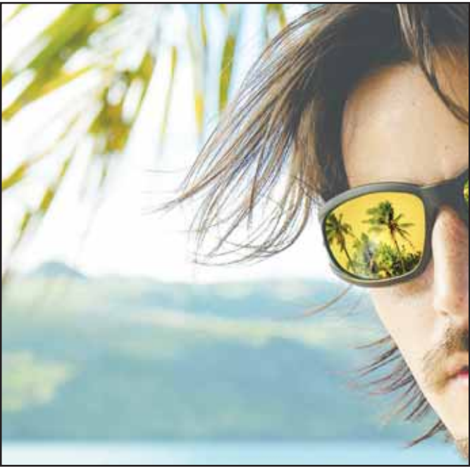
This album cover image released by Warner Music Latina shows ‘Babylon Club’ by Danny Ocean.