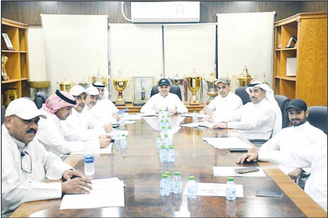
The meeting in progress.