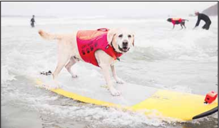
Charlie looks towards the camera while riding a wave to the shore during the World Dog Surfing Championships at Linda Mar Beach in Pacifica, Calif. on Saturday, Aug. 2.

SAN FRANCISCO, Aug 4, Charlie the 10-year-old yellow lab likes surfing so much, he will grab his surfboard and run toward the water. His humans sometimes have to hide his board if they want to chat with friends on the beach. Charlie joined about 15 to 20 other canine wave riders in Pacifica, 14 miles (22 kilometers) south of San Francisco, on Saturday at the World Dog Surfing Championships, an annual contest that draws thousands of spectators to Pacifica State Beach. Pooches competed against similarly sized peers for a chance to appear in the finals. Additional heats featured multiple dogs surfing tandem or riding with people. Labs, terriers and spaniels in monogrammed life vests dog-paddled out into the Pacific. Once out on the waves, their owners helped them hop on colorful boards and hang ten as the crowd cheered from the beach.