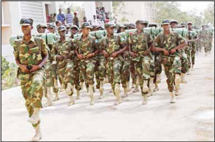
Soldiers march during Somali National Army Day in Mogadishu, Somalia on April 12, 2014.

MOGADISHU, Aug 4, (Xinhua): The African Union Support and Stabilization Mission in Somalia (AUSSOM) confirmed on Sunday that its troops, backed by Somali government forces, killed more than 50 al-Shabab militants during a fierce fighting in Bariire town in southern Somalia on Friday. In a statement issued in Mogadishu, the capital of Somalia, AUSSOM also refuted media reports alleging heavy casualties among its soldiers in Bariire. “AUSSOM wishes to clarify that its forces, in coordination with the Somali National Armed Forces (SNAF), initiated a major offensive to recapture Bariire town on Aug. 1,” the AU mission said, responding to claims made by al-Shabab regarding the destruction of AU-owned armored personnel carriers and the retreat of AUSSOM troops following intense fighting in Bariire. “The joint military operation has resulted in substantial losses for the terrorist group, with over 50 al-Shabab militants killed and many others sustaining serious injuries,” AUSSOM said. The agriculturally rich Bariire town, which lies about 60 km southwest of