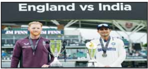
England's captain Ben Stokes, left, and India's captain Shubman Gill after end of the fifth cricket test match between England and India at The Kia Oval in London.