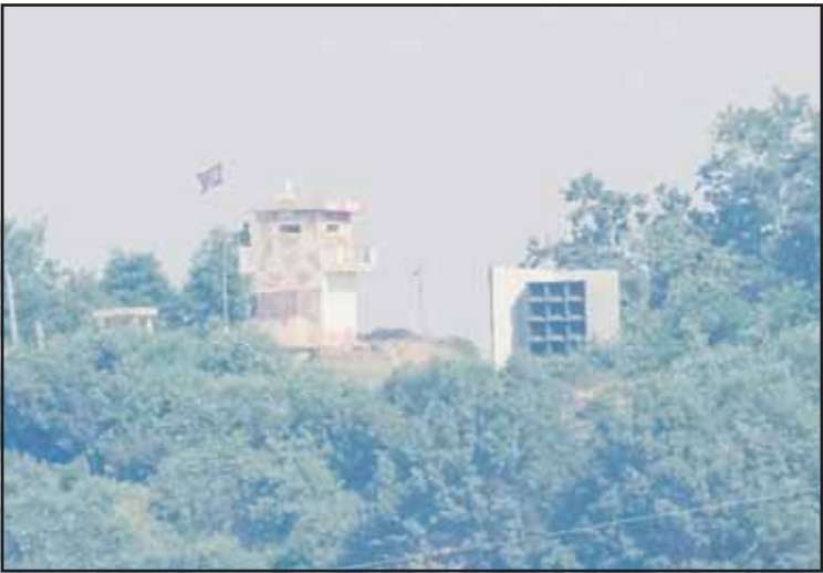
A North Korean military guard post, (left), and loudspeakers are seen from Paju, South Korea, near the border with North Korea, June 12.

Thai and Cambodian officials met in Malaysia on Monday for the first round of cross-border committee talks since a tense ceasefire was brokered last week after five days of deadly armed border clashes that killed dozens and displaced over 260,000 people. The four-day General Border Committee meetings were initially due to be hosted by Cambodia, but both sides later agreed to a neutral venue in Malaysia, the annual chair of the Association of Southeast Asian Nations, which has mediated the halt in hostilities last month. Malaysia’s prime minister is Anwar Ibrahim.