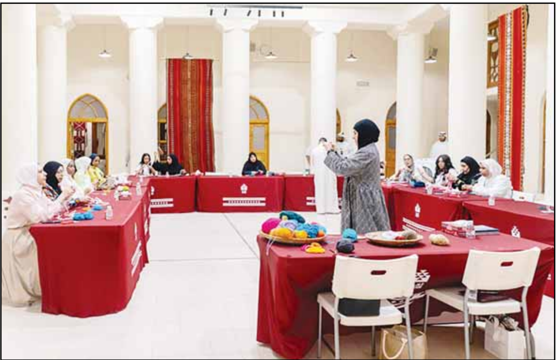
'Weaving Cup Coasters' workshop held as part of 'My Cultural Summer 17' Festival activities. KUNA photos and strengthen their connection to cultural and national identity. Al-Baloushi explained that the art of Sadu is one of the oldest traditional crafts in Kuwait and the Arabian Gulf, representing a vital part of the region’s heritage and culture. It involves weaving wool using a simple, handmade loom, and decorating

adults make meaningful use of their free time, enhance their skills and creative abilities in various fields,