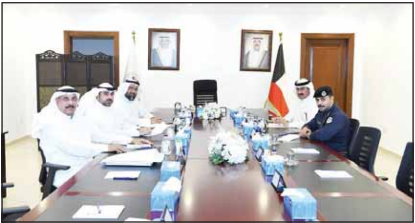
The Complaints and Petitions Committee at the Farwaniya Governorate Council held its inaugural meeting on Monday.

The data update process includes verifying continued residence in the allocated housing unit; and reviewing personal, social and employment information of beneficiaries. This step is intended to enhance transparency and accuracy in the delivery of housing care, ensuring that support reaches those who truly qualify.