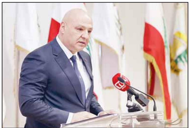
In this photo released by the Lebanese Presidency press office, Lebanese President Joseph Aoun speaks during a ceremony marking Army Day at the Lebanese Defense Ministry in Yarzeh, near Beirut, Lebanon, Thursday, July 31, 2025.

He further proposed allocating USD 1 billion annually for ten years, affirming his commitment to constitutional principles and his inaugural address, noting that although he negotiated quietly, he always upheld the Consti-