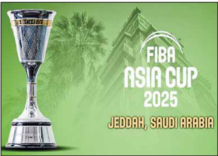
FIBA Asia Cup 2025 promotional image.

Saudi Arabia aims for deep run in FIBA Asia Cup on home soil