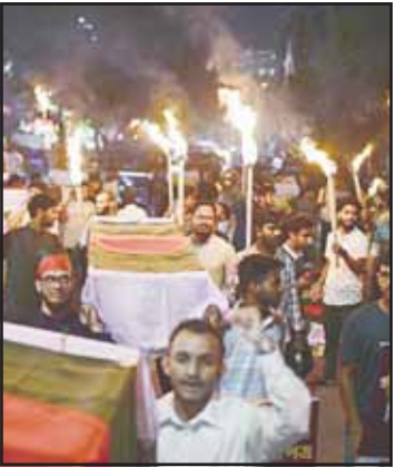
In this July 16, 2025 photo, activists carry symbolic coffins and torches during a procession to mark the day of a student-led protest one year ago, in Dhaka, Bangladesh.