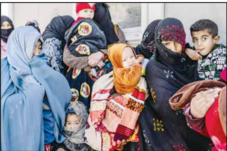
Mothers along with babies who suffer from malnutrition wait to receive help and check-up at a clinic run by the WFP, in Kabul, Afghanistan, Jan. 26, 2023.

ISLAMABAD, Aug 4, (Agencies): Afghanistan is seeing its sharpest-ever surge of child malnutrition, the World Food Program said Monday, adding it needed $539 million to help the country's most vulnerable families. Almost 10 million people, a quarter of Afghanistan's population, face acute food insecurity. One in three children is stunted. The WFP said the rise in child malnutrition was linked to a drop in emergency food assistance over the past two years because of dwindling donor support. In April, the administration of US President Donald Trump cut off food aid to Afghanistan, one of the world's poorest countries. The US had been the largest funder of the WFP, providing $4.5 billion of the $9.8 billion in donations last year. Previous US administrations viewed such aid as serving national security by alleviating conflict, poverty, extremism and curbing migration. Food insecurity in Afghanistan is being worsened by mass returns from neighboring countries, which are deporting foreigners they say are living there illegally. The WFP said it has supported 60,000 Afghans returning from Iran in the last two months, a fraction of those crossing the border. "Going forward, the WFP does not have sufficient funding to cover the returnee response at this time and requires $15 million to assist all eligible returnees from Iran," said WFP Com-