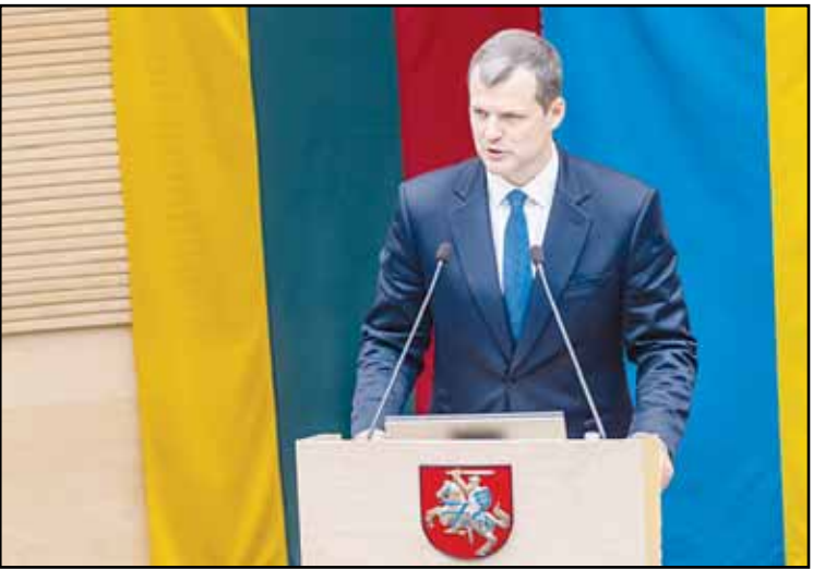
Lithuania's Social Democratic party member Gintautas Paluckas, nominated as the next Prime Minister, speaks during a parliament session in Vilnius, Lithuania on Nov 21, 2024.

VILNIUS, Aug 4, (Xinhua): Lithuanian Prime Minister Gintautas Paluckas stepped down from his post on Monday, triggering the automatic resignation of the entire cabinet. Paluckas confirmed his decision during an emergency government meeting on Monday morning, the Baltic News Service reported. "Having made the decision to resign as prime minister, I announce that the 19th Government of Lithuania is resigning," Paluckas said at the start of the meeting. He added that he would formally submit his resignation to President Gitanas Nauseda later on Monday and expressed gratitude to his ministers for their cooperation. Under Lithuanian law, the prime minister's resignation mandates that the president be informed the same day. Nauseda is now expected to accept the resignation via official decree and assign the