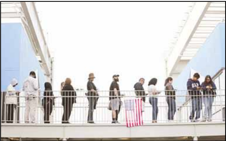
Voters wait in a long line at a polling place at the Michelle and Barack Obama Sports Complex on Election Day on Nov 5, 2024, in Los Angeles.