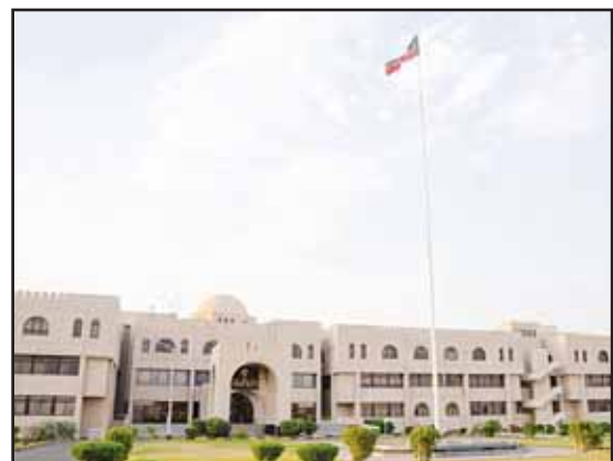
Kuwait Ministry of Health building.

Security sources affirmed that similar campaigns will continue throughout the governorate to apprehend violators, deter reckless driving, and ensure full enforcement of the law.