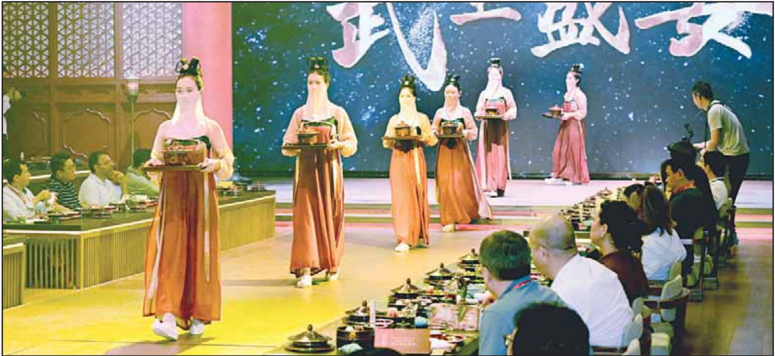
A royal feast fit for emperors — delegates indulge in an array of traditional Chinese dishes served at the elegant Wuhuang Banquet, capturing the flavors of Luoyang's imperial past.

Then the spectacle began: plates appeared, each a sensory story in itself. Golden Plate Braised Carp, glossy and aromatic, broke apart gently under my chopsticks, releasing a perfume of ginger and sweet soy. Di Gong Bafang Pot steamed from the center of the table, its broth swirling with green onions, goji berries, and earthy mushrooms. The flavors