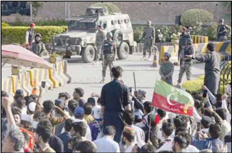
Paramilitary soldiers from Frontier Corps stand guard outside their headquarters, where supporters of Pakistan's former prime minister Imran Khan protest against the arrest of their leader, in Peshawar, Pakistan on May 9, 2023.

led by current Prime Minister Shahbaz Sharif. Khan after his ouster had accused the military and his political rival Sharif of ousting him under a U.S. plot, the charges which they denied. Also: ISLAMABAD: Pakistani Prime Minister Shehbaz Sharif on Wednesday reaffirmed his government's resolve to combat human trafficking, calling it an organized crime threatening vulnerable populations and national security. In a message marking the World Day Against Trafficking in Persons, Sharif urged greater awareness and coordinated efforts to stop illegal migration and exploitation. This year's theme, "Human Trafficking is an Organized Crime – End the Exploitation," underscores the urgent need for collective action at national