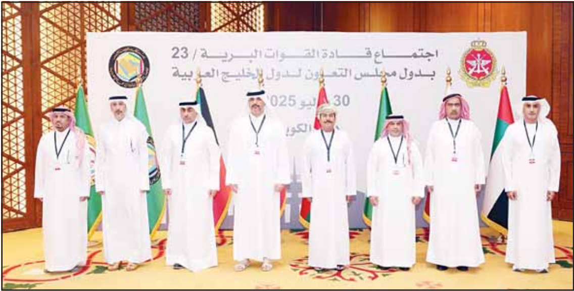
A group photo of the commanders of the land forces of the Gulf Cooperation Council countries.