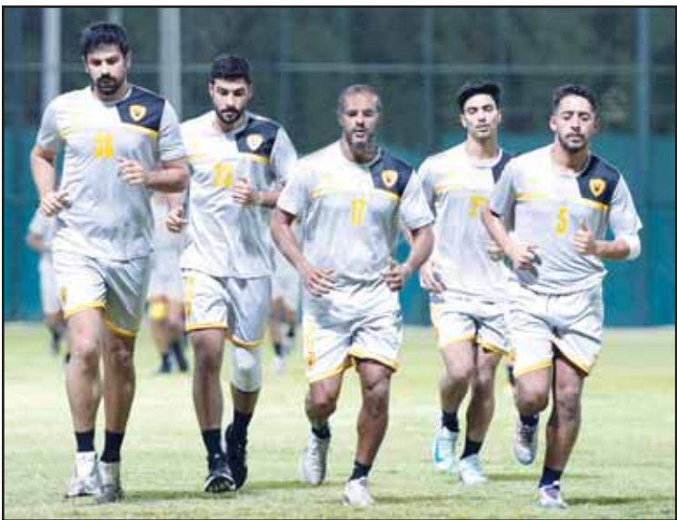
Players undergo light training.