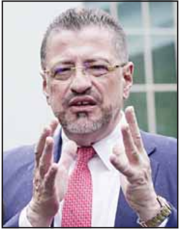
Costa Rica President Rodrigo Chaves talks with reporters outside the White House on Aug 29, 2023, following his meeting with President Joe Biden.

SAN JOSE, Costa Rica, July 31, Costa Rican President Rodrigo Chaves announced a mass exodus from his Cabinet Wednesday, a move to secure a congressional majority for his party in next year's election. Six Cabinet ministers, as well as his vice president, resigned on the final day of eligibility to compete in the 2026 general election. There had been talk that maybe even Chaves himself would step down before his term ends next year to run in order to give his party the best chance of winning, but he dismissed that possibility Wednesday. "The decision was to stay president of the republic, I'm not going to resign," Chaves said in a news conference, adding that his administration's public support was so robust it wasn't necessary for him to lead the