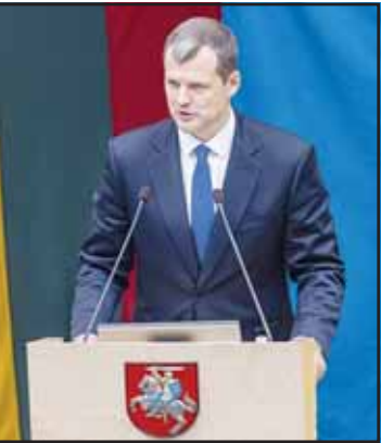
Lithuania’s Social Democratic party member Gintautas Paluckas, nominated as the next Prime Minister, speaks during a Lithuanian’s parliament session in Vilnius, Lithuania on Nov 21, 2024.

VILNIUS, Lithuania, July 31, Lithuania Prime Minister Gintautas Paluckas stepped down on Thursday following investigations into his business dealings that prompted protests in the Baltic country’s capital calling for his resignation. Lithuanian President Gitanas Nausėda announced Paluckas’ resignation to the media on Thursday morning. A spokesperson for Paluckas did not immediately respond to a request for comment. Paluckas, a newly established leader of the center-left Social Democrats, ascended to the role late last year after a three-party coalition formed following parliamentary elections in October. His entire cabinet is now expected also to resign, potentially leaving the country without an effective government weeks before Russia holds joint military exercises with neighboring Belarus. Lithuanian foreign policy is unlikely to change as a result of the government shakeup. Nausėda, who was elected separately, is the country’s face on the world stage and has been one of the most stalwart supporters of Ukraine in its fight against invading Russian forces.