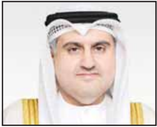
Nasser Al-Sumait, Minister of Justice