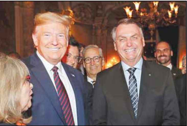
Brazil's President Jair Bolsonaro, right, stands with President Donald Trump during a dinner at Mar-a-Lago, Palm Beach, Florida on March 7, 2020. Bolsonaro's son, Eduardo is pictured in background on right.

RIO DE JANEIRO, July 31, The US Treasury Department has announced sanctions on Brazilian Supreme Court Justice Alexandre de Moraes over alleged suppression of freedom of expression and the ongoing trial of former president Jair Bolsonaro. De Moraes oversees the criminal case against Bolsonaro, who is accused of masterminding a plot to stay in power despite his 2022 election defeat to current President Luiz Inácio Lula da Silva. "De Moraes is responsible for an oppressive campaign of censorship, arbitrary detentions that violate human rights, and politicized prosecutions - including against former President Jair Bolsonaro," US Treasury Secretary Scott Bessent said in a statement. The department cited the Global Magnitsky Human Rights Accountability Act, which targets perpetrators of human rights abuse and corrupt officials, as its authority to issue the sanctions. The decision orders the freezing of any assets or property de Moraes may have in the US. Brazil's Supreme Court and the Presidential Palace did not immediately respond to a request for comment. Wednesday's sanctions follow the US State Department's announcement of visa restrictions on Brazilian judicial officials, including de Moraes, on July 18.