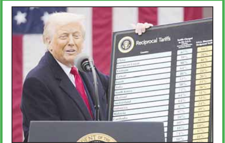
President Donald Trump speaks during an event to announce new tariffs in the Rose Garden at the White House, on April 2, 2025, in Washington.

der friendly competitions. The program also gave the students a view on practical leadership skills, based on Steven R. Covey’s prominent book “The 7 Habits of Highly Effective People”, through which the students obtained valuable tools to manage their thoughts, actions, and feelings and consequently provide them with remarkable and confident future leadership abilities. This sponsorship comes in line with NBK’s strategic partnership with LOYAC, which echoes the bank’s unwavering support for Kuwait’s youth by enabling them to invest in their future and become part of an aware and leading generation”. NBK will continue to sponsor and support initiatives that align with its social responsibility values among all society segments and non-profit organizations, especially the ones that nurture youth development and their future needs, as it strongly believes in the significant effect they carry upon society. It is worth noting that LOYAC is a non-profit organization that aims to support the youth by providing training opportunities and specialized educational and volunteering developmental programs.