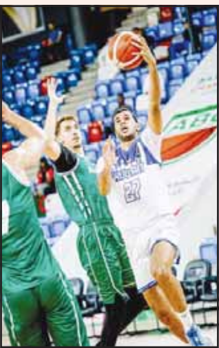
Players fighting for the ball.