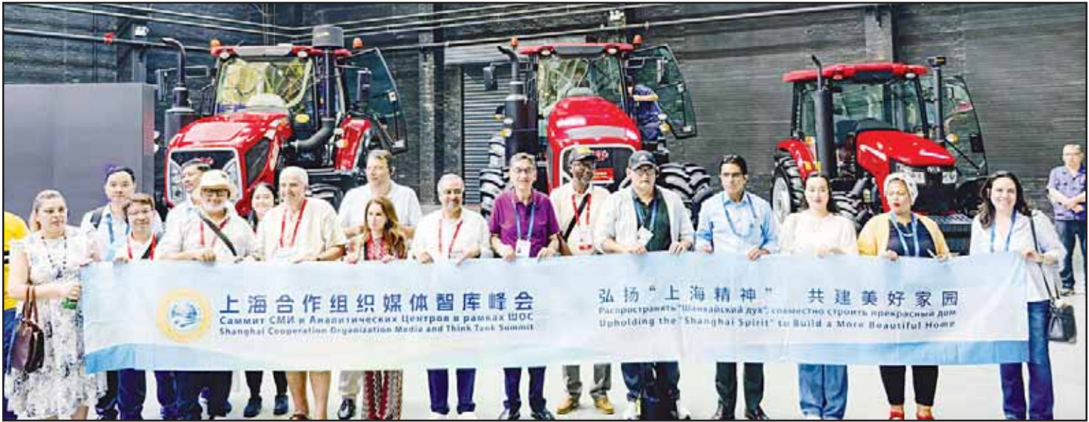
Delegates gather for a group photo during their insightful tour of YTO Group, one of China's leading agricultural machinery manufacturers.