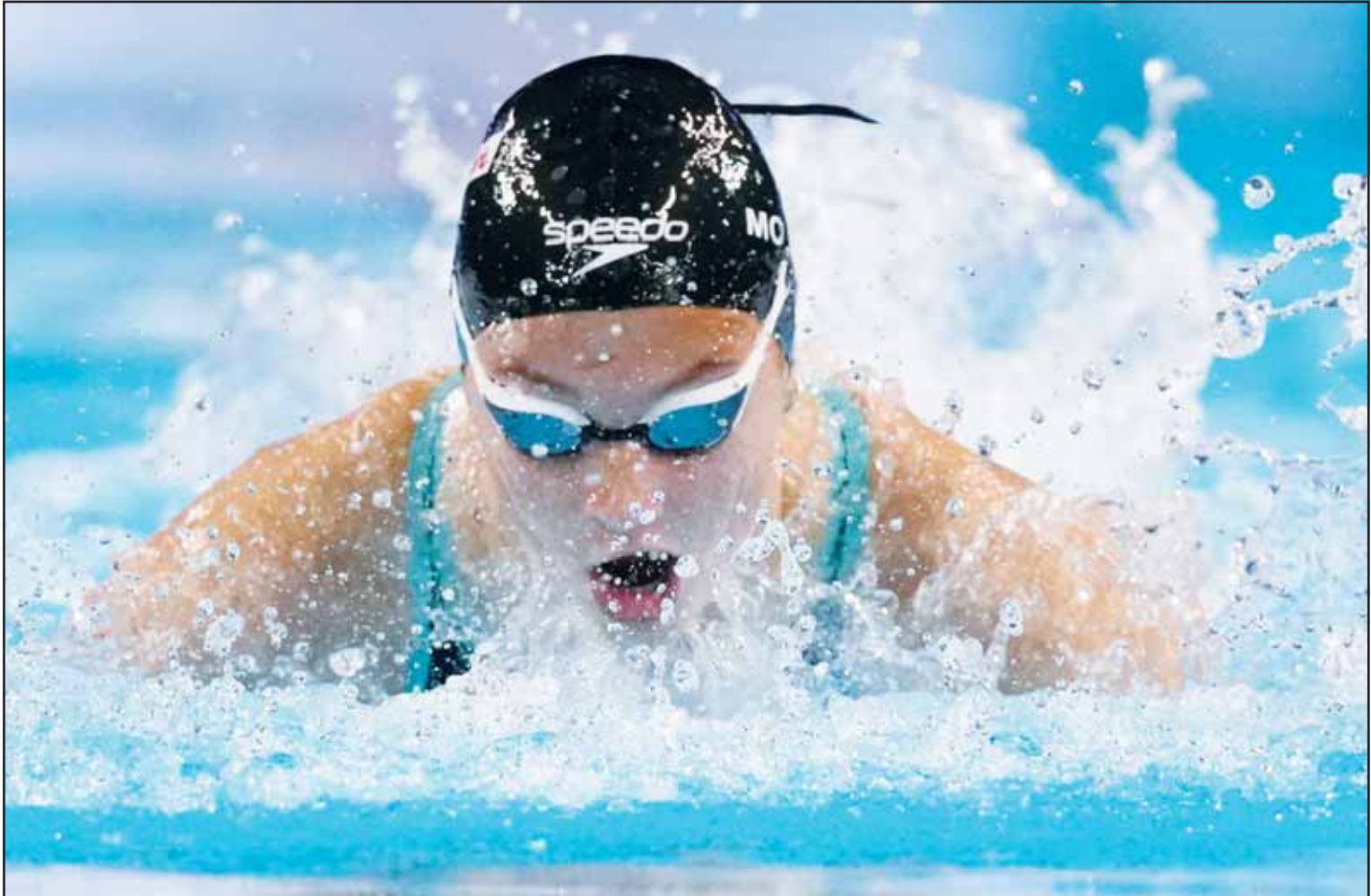
Summer McIntosh of Canada competes in the women's 200-meter butterfly final at the World Aquatics Championships in Singapore.

meters, but faded slightly over the final stretch. The current record of 2:01.81 was set by Liu Zige of China in 2009 during the super-suit era. "My coach and I had one goal — to