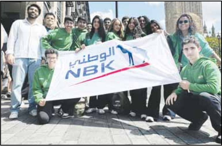
Youth Leadership Program

KUWAIT CITY, July 31: In line with its deep commitment to social responsibility and continued support to the development of Kuwait’s youth, National Bank of Kuwait sponsored the Youth Leadership Program (YLP), which aims to develop skills of leadership, self-awareness, and resilience for the youth, in collaboration with a non-profit organization. The program, which targets 14- to 18-year-old high school students, took place in the United Kingdom in a period that extended from the 13th until the 19th of July 2025, with the participation of 12 students. The Youth Leadership Program is a transformative and unique experience in which participants get the opportunity to undergo a life-changing adventure for one week in Bedfordshire’s breathtaking nature where they unleash their hidden abilities and energies. Moreover, the program aims to develop leadership skills by teaching the students the habits of effective people, which help them achieve current and future successes and face future challenges confidently. In this extensive journey, the students participated in outdoor activities, including walking down the green fields and exploring UK’s enchanting towns, in addition to building relationships and creating connections un-