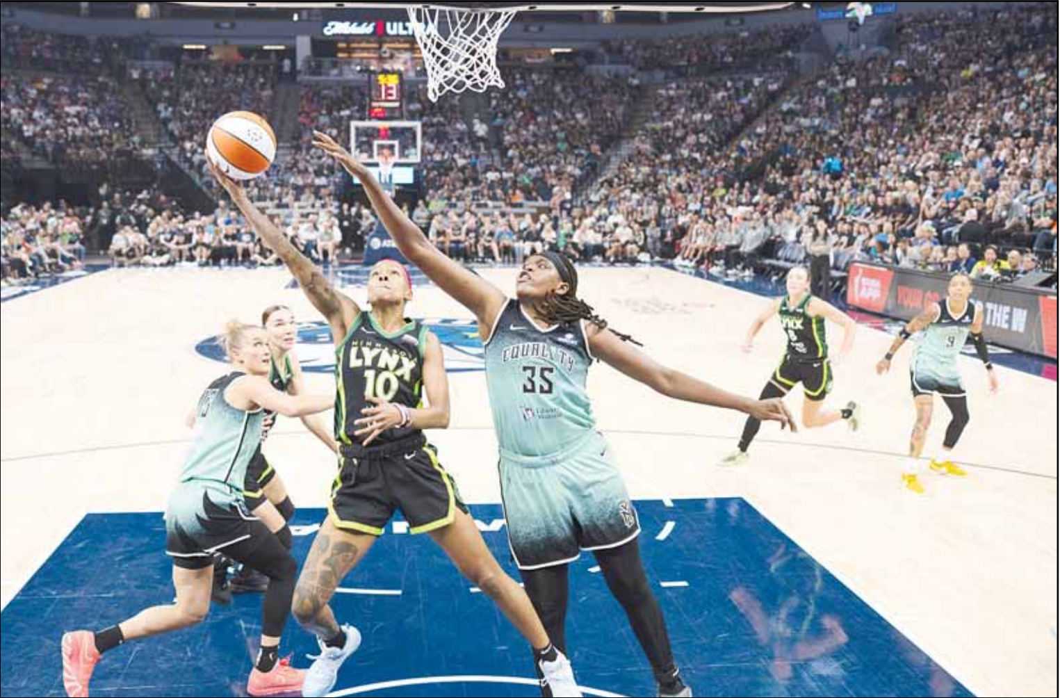
Minnesota Lynx guard Courtney Williams (10) shoots while trailed by New York Liberty center Jonquel Jones (35) in the second quarter in a WNBA basketball game in Minneapolis.

Allisha Gray had 15 points, Brionna Jones scored 14 and Maya Caldwell