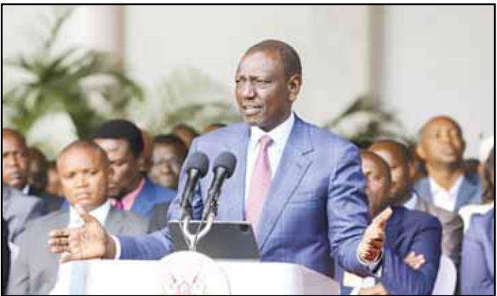
Kenyan President William Ruto gives an address at the State House in Nairobi, Kenya on June 26.

NAIROBI, July 31, (Xinhua): Kenyan President William Ruto on Wednesday signed the Conflict of Interest Bill into law to help intensify the fight against corruption in the country. Ruto said the new law, which repeals the Public Officer Ethics Act, introduces a detailed structure to manage conflicts of interest in government to curb the abuse of power by public officers, ensuring that public resources are used for their intended purpose. "This is a very consequential moment in Kenya. We are making it much more difficult for people to take advantage of the offices they occupy," he said in a statement issued in Nairobi, the capital of Kenya, after signing the bill. Ruto said the new law sets clear rules to ensure that public officers serve with integrity, transparency, and accountability. He pointed out that the new legislation also gives Kenyans the opportunity to hold public officers accountable in their exercise of power. The law empowers the Ethics and Anti-Corruption Commission (EACC) to oversee its implementation, and the anti-graft body