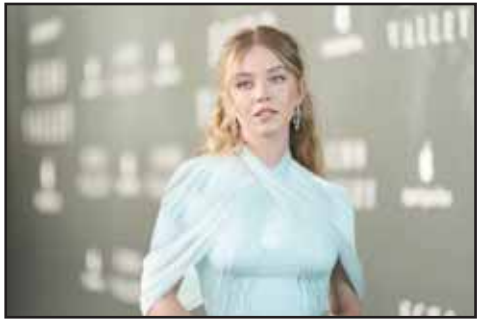
Sydney Sweeney poses for photographers upon arrival at the premiere of the film 'Echo Valley' on June 10, 2025, in London.

In a news release, the company noted "Sweeney's girl next door charm and main character energy - paired with her ability to not take herself too seriously - is the hallmark of this bold, playful campaign."