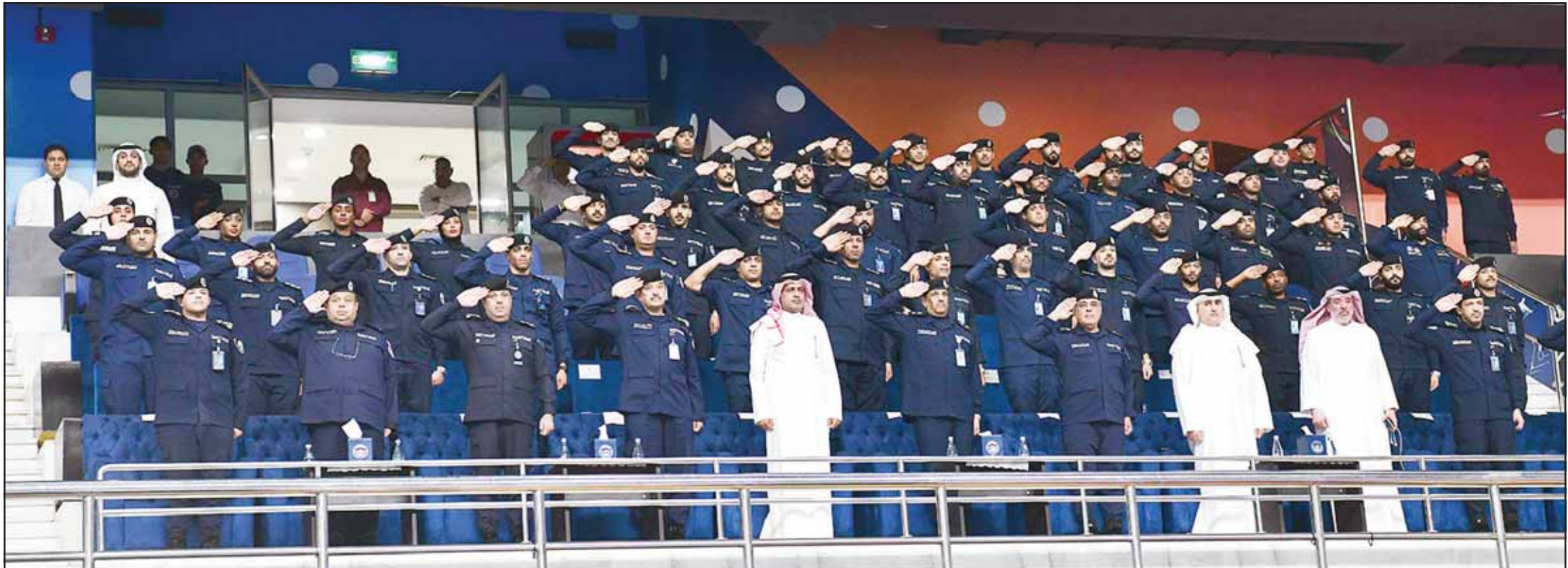
Cadet officers and officials at the draw event.