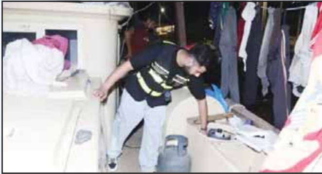
A KFF inspector searching the boat.