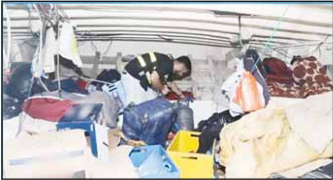
Goods stored in a boat haphazardly.