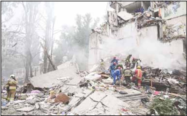
Rescuers work in a destroyed apartment building after a Russian missile attack in Kyiv, Ukraine on July 31. (AP)

KYIV, Ukraine, July 31, (AP): Russia attacked Ukraine’s capital with missiles and drones overnight, killing at least nine people, including a 6-year-old boy, and wounding 124 others, Ukrainian authorities said Thursday. Ten children, the youngest being a 5-month-old girl, were among the injured, Kyiv City Military Administration head Tymur Tkachenko said. A large part of a nine-story residential building collapsed after it was struck, he said. Rescue teams were at the scene searching for people trapped under the rubble.