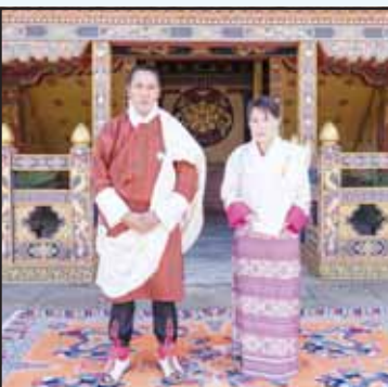
Phub Dorji, Ambassador Extraordinary and Plenipotentiary of the Kingdom of Bhutan to Kuwait, UAE and Bahrain

By Fares Ghalib Al-Seyassah/Arab Times Staff KUWAIT CITY, July 31: The Royal Court of Bhutan has announced that King Jigme Khesar Namgyel Wangchuck issued a decree on the Ambassador Extraordinary of Phub Dorji as Ambassador Extraordinary and Plenipotentiary of the Kingdom of Bhutan to Kuwait, as well as the United Arab Emirates (UAE) and Bahrain. The investiture ceremony for the new ambassador was held at the Royal Palace in the capital -- Thimphu, with the senior officials from the Ministry of Foreign Affairs and Foreign Trade of Bhutan in attendance. This marks the official commencement of his diplomatic duties.