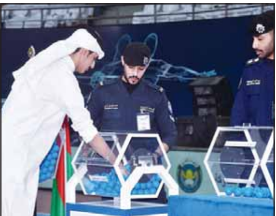
The draw in progress.

military work requirements. He added that they passed personal interviews under the direct supervision of Al-Adwani with the participation of a specialized committee. The interviews resulted in 1,985 applicants who met the initial registration and admission requirements qualifying for the lottery. He disclosed that the number required to join the 49th batch of Cadet Officers Course is 150, in addition to 50 reserve seats; while the number of seats for the external scholarship courses in GCC countries totaled 45, along with 45 reserve seats. He added the Coast Guard course at Mohammad bin Ghanem Al Ghanem College in Qatar has five seats and 19 reserve seats. He said all candidates will undergo advanced medical examinations as the final stage of admission to ensure that all specified requirements and standards are met.