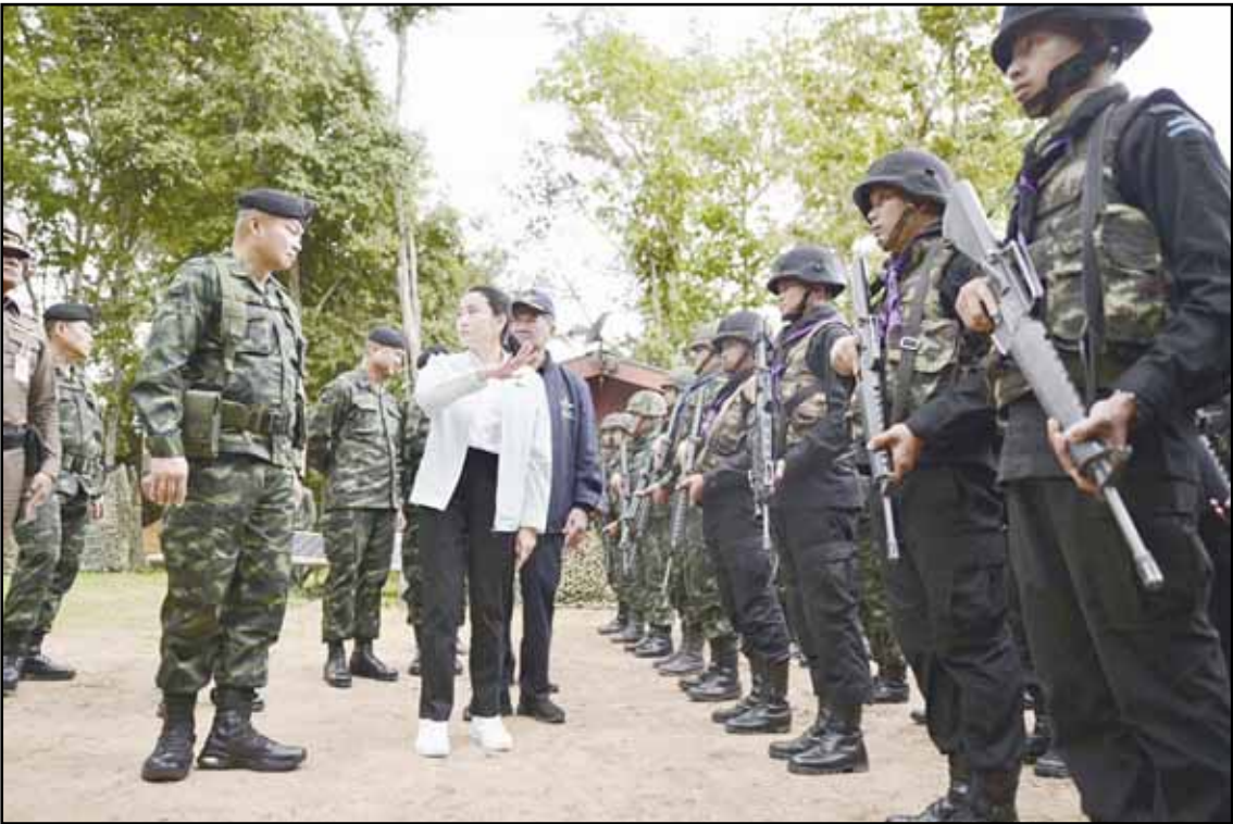
In this photo released by The Government Spokesman Office, Thailand's Prime Minister Paetongtarn Shinawatra, talks to Commander of the 2nd Army Area Lieutenant General Boonsin Padklang, (left) during a meeting with soldiers at Ubonratchathani province, northeast of Bangkok on June 20. (AP)

Also: BANGKOK: Thailand's Constitutional Court on Wednesday set a deadline for suspended Prime Minister Paetong-tarn Shinawatra to submit a defense in her ethics violation case after granting a final extension. In a statement, the court said a panel of judges agreed 5-4 to set a final deadline for Paetongtarn to respond to the allegations on Aug 4, citing her request to seek an additional 15 days to gather evidence necessary to complete the defense. The court said this would be the final extension, and if no additional documents are submitted by the deadline, it will proceed with the case based on the existing evidence. On July 1, the court suspended Paetongtarn after accepting the case petitioned by a group of senators seeking her removal from office over a leaked phone call on border issue with Cambodia.