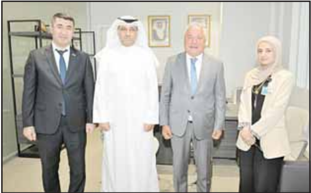
Kuwait University delegation meets the Tajik ambassador.

confuses charm for credibility and social pleasantries for diplomatic messaging. Some recent media appearances have unintentionally exposed these weaknesses. They leave us asking a difficult but necessary question. If this is what we see in public, what happens behind closed doors in private briefings in which the consequences are real, even if they are not immediate. This perspective is informed by years of professional engagement with diplomats, journalists, and researchers in institutions stretching from Washington to Tokyo. As a member of leading international press and policy forums, I hear and see the reputation we carry. Kuwait is not a newcomer. While many nations still struggle for a voice, we already have one. But unless we protect it, refine it, and strengthen it, we may wake up one day to find that voice gone. Not silenced by others, but diminished by our own neglect and lack of preparation. This is why we must remember a truth that applies to any nation. Countries are built through steady effort. They fall through quiet complacency. The question now is whether we have the courage to question the cracks, act with purpose, and restore what should never have been allowed to fade.