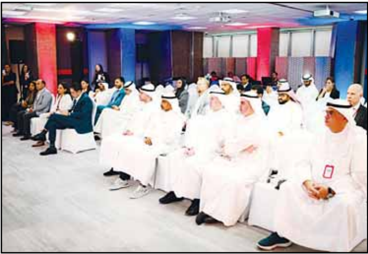
Part of the audience.

Continuing its commitment to encouraging innovative and creative ideas among employees