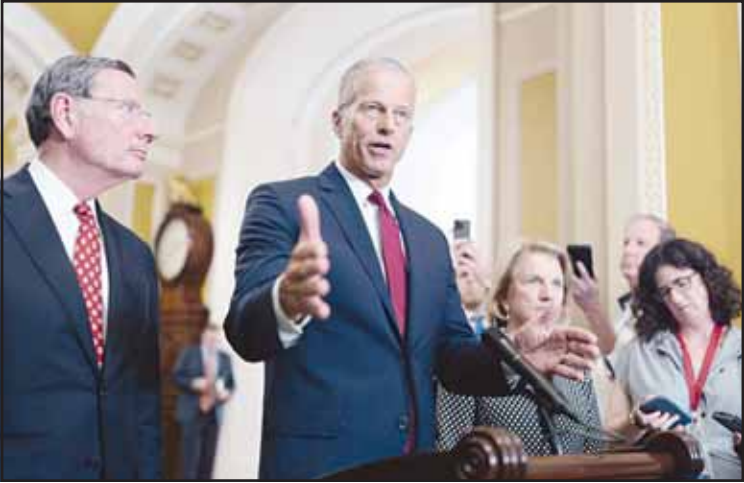
US Senate Majority Leader John Thune, R-SD, joined at left by Sen John Barrasso, R-Wyo, the GOP whip, speaks to reporters following closed-door strategy meetings, at the Capitol in Washington on July 22.

But Thune said the rules are being “misused” by Democrats, and there is a lot of interest in the GOP conference in potentially speeding up the process. A rules change, in the end, “could benefit both parties when they have the presidency.” It’s unclear how Republicans would change the rules, but they could potentially cut the number of procedural votes, reduce or eliminate the standard two hours of debate time or somehow force nominations to be bundled together, among other possible options. A rules change would require a simple majority vote, so almost all of the Senate’s 53 Republicans would have to be on board.