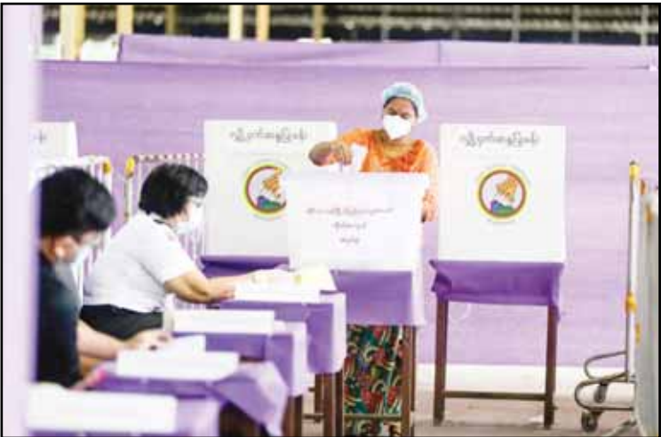
A voter casts ballot at a polling station on Nov. 8, 2020, in Yangon, Myanmar. A court in Myanmar on Sept 2, 2022 sentenced the country's ousted leader Aung San Suu Kyi to three years' imprisonment after finding her guilty of involvement in election fraud.

ies formed after the army takeover, including the State Administration Council, have been dissolved and all government functions have been handed