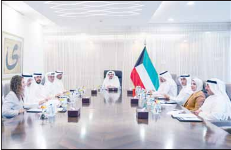
HH the PM chairs the ministerial committee meeting at Bayan Palace.

Saturday night will be warm to hot and relatively humid, especially along coastal areas. Winds will be variable to northwesterly, light to moderate, ranging from 12 km/h to 32 km/h. Minimum temperatures are expected to range from 33°C to 35°C. Sea conditions will continue to be slight to moderate, with wave heights between one and four feet.