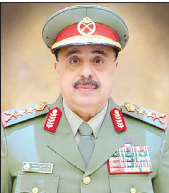
Lt. Gen. Hashim Al-Rifai

He called for the establishment of marine reserves and the implementation of a sustainable system to protect fishery resources, which contribute to the preservation of marine ecological balance.