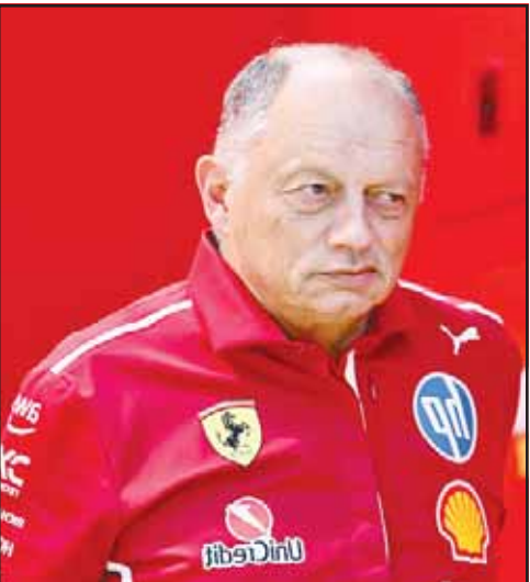
Ferrari team principal Fred Vasseur walks through the paddock at the Hungaroring race-track, in Mogyoród, Hungary ahead of the Hungarian Formula One Grand Prix.

“Over the past 30 months, we’ve laid strong foundations, and now we must build on them with consistency and determination. We know what’s expected, and we’re all fully committed to meeting those expectations and taking the next step forward together.