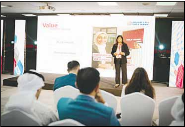
Part of the presentations from the contestants.