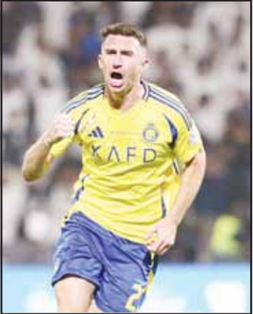
In this file photo, Al-Nassr defender Aymeric Laporte celebrates after scoring.

Celta Vigo has completed the signing of Spain international winger Bryan Zaragoza ahead of the club’s return to European competition next season.