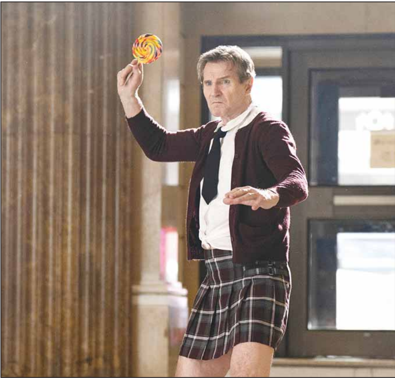
This image released by Paramount Pictures shows Liam Neeson in a scene from 'The Naked Gun.'