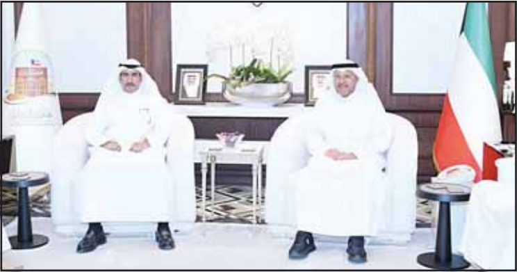
Farwaniya Governorate photo Farwaniya Governor Sheikh Athbi Nasser Al-Athbi Al-Sabah with acting Undersecretary of the Ministry of Public Works Eid Al-Rashidi.

KUWAIT CITY, July 31: Farwaniya Governor Sheikh Athbi Nasser Al-Athbi Al-Sabah on Wednesday had a meeting with acting Undersecretary of the Ministry of Public Works Eid Al-Rashidi in his office at the Farwaniya Governorate headquarters where they discussed ways to further strengthen cooperation in the interest of the public. They also talked about development projects, implementation mechanisms, and the citizens' suggestions and complaints regarding some roads in the governorate; particularly the vital roads. During the meeting, the Governor expressed his gratitude to Al-Rashidi