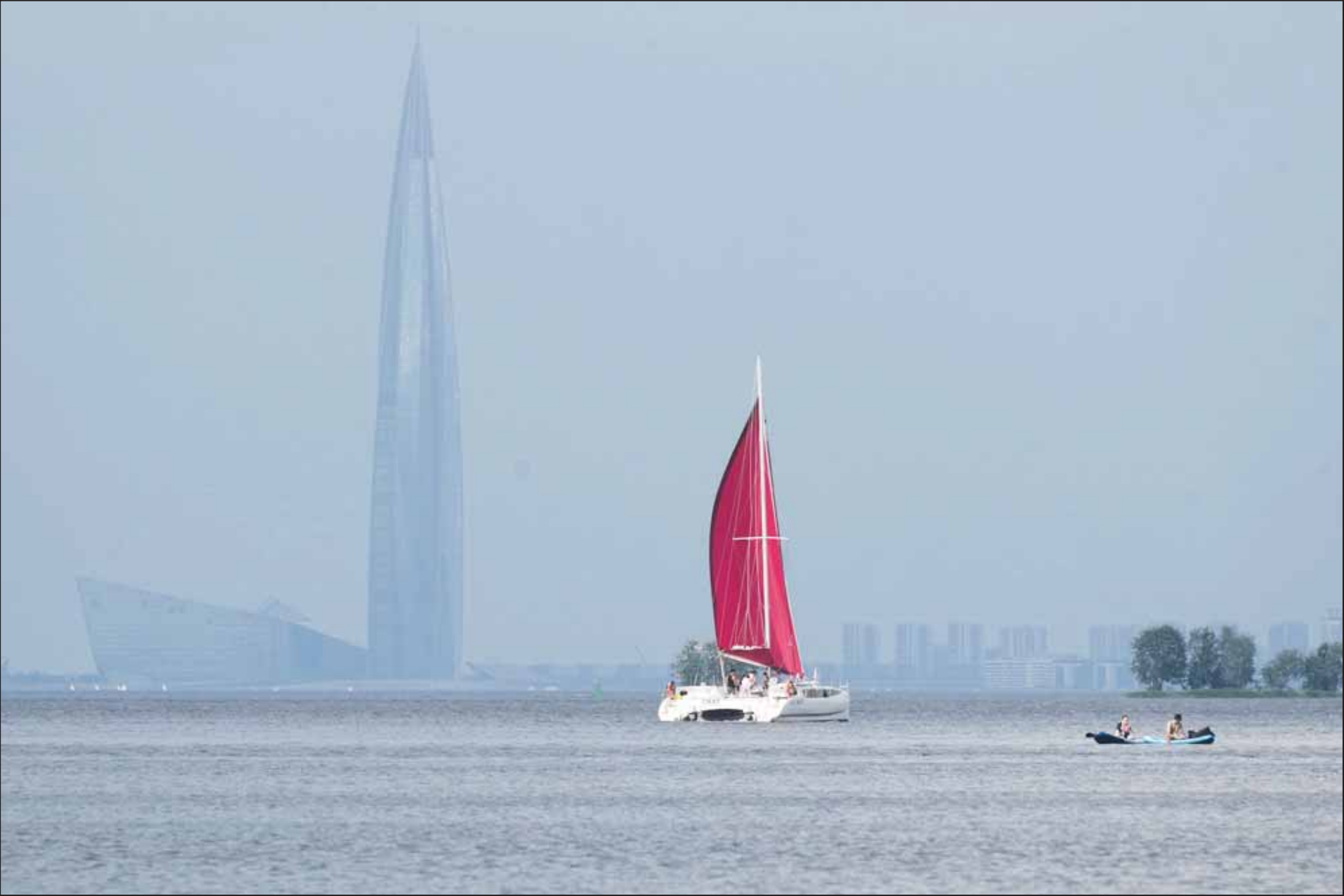
A sail catamaran floats in the Finnish Gulf in St. Petersburg, Russia, on July 28, 2025, with the Lakhta Center skyscraper, the headquarters of Russian gas monopoly Gazprom in the background.