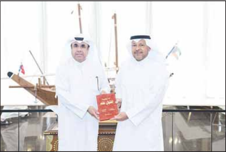
Farwaniya Governorate photo Author Al-Sultan presents his latest book to Farwaniya Governor.

KUWAIT CITY, July 31, (KUNA): Minister of Health Dr. Ahmad Al-Awadhi on Thursday launched the 10th edition of the annual national blood donation campaign, coinciding with the 35th anniversary of the brutal Iraqi invasion of Kuwait. Speaking at the launch, Al-Awadhi said the three-days campaign honors the sacrifices of Kuwait’s martyrs and reflects national unity across government, military, and civil society sectors. He urged citizens and residents to donate blood at all Ministry of Health centers, including the Central Blood Bank in Jabriya, noting that over 100 blood bags were collected in the first two hours of the campaign. Assistant Director General of the General Directorate of Security Relations and Media at the Ministry of Interior, Colonel Yousef Mirshed affirmed the ministry’s continued support for such initiatives, emphasizing their humanitarian and social dimensions alongside security duties. Director of Blood Transfusion Services Dr. Reem Al-Roudhan said the campaign has been running for a decade to promote voluntary donation and save lives. Last year, about 95,000 units were collected, with a 4 percent annual increase. She pointed to the effective participation of the military corps, represented by the Ministries of Defense, Interior and the National Guard, in addition to civil society institutions and private sectors.