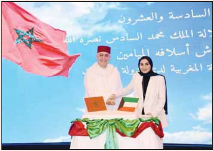
Ambassador Ali Ben Issa and Minister Al-Huwailah cut the cake in celebration of Moroccan Throne Day.