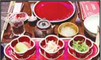
One of the many delicacies served at the Wuhuang Banquet — a taste of Luoyang's rich culinary heritage inspired by imperial traditions.

As part of the Zhengzhou-Luoyang-Xinxiang National Innovation Demonstration Zone, Luoyang is advancing in aerospace, new materials, and electronic information. It houses 108 national-level innovation