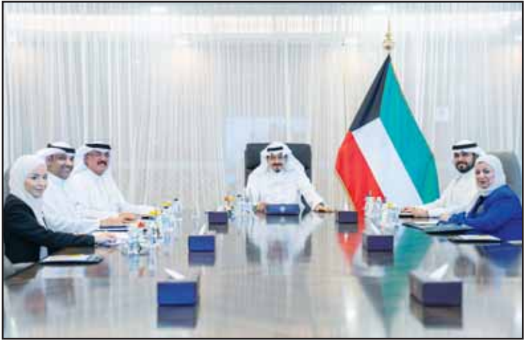
HH the PM chairs a meeting on Thursday with Minister of Education along with several officials.