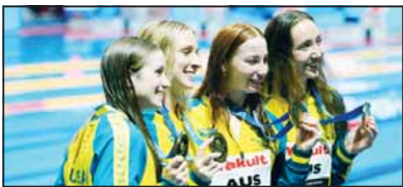
Gold medalists team Australia pose after the women's 4x200-meter freestyle relay final at the World Aquatics Championships in Singapore.