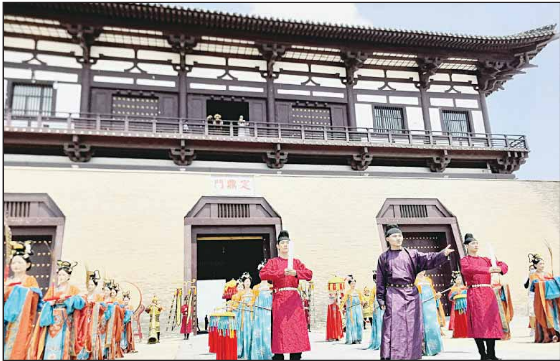
Delegates explore the historic Dingding Gate Museum, immersing themselves in the rich cultural heritage and ancient legacy of Luoyang.