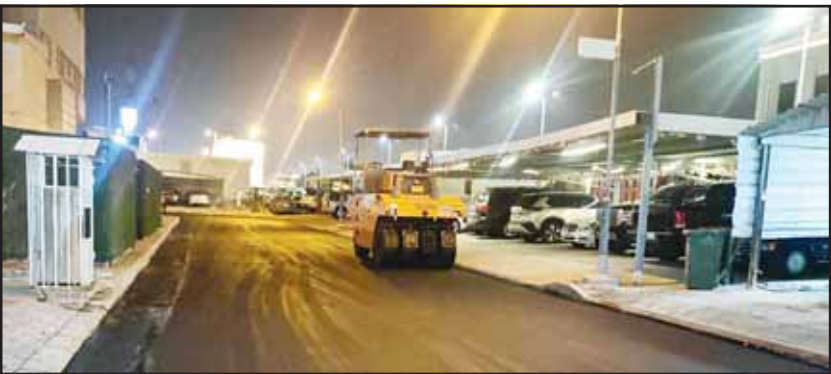
An engineering team from the Ministry of Public Works is following up on road maintenance developments in Rabia on the ground.