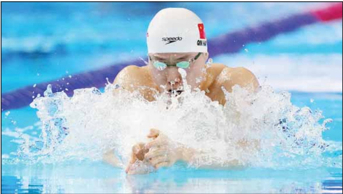
Qin Haiyang of China competes during the men's 100m breaststroke semifinal of swimming at the World Aquatics Championships in Singapore.