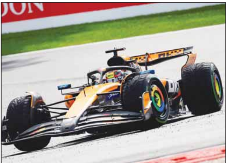
McLaren driver Oscar Piastri of Australia steers his car during the Formula One Grand Prix at the Spa-Francorchamps racetrack in Spa, Belgium.

Piastri took his sixth win of the season and is the first McLaren driver to win the Belgian Grand Prix since Jenson Button in 2012.