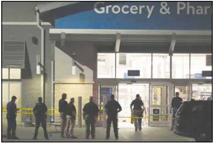
Law enforcement officers are seen stationed outside a Walmart where 11 people were stabbed in a violent attack on July 26 in Traverse City, Michigan.