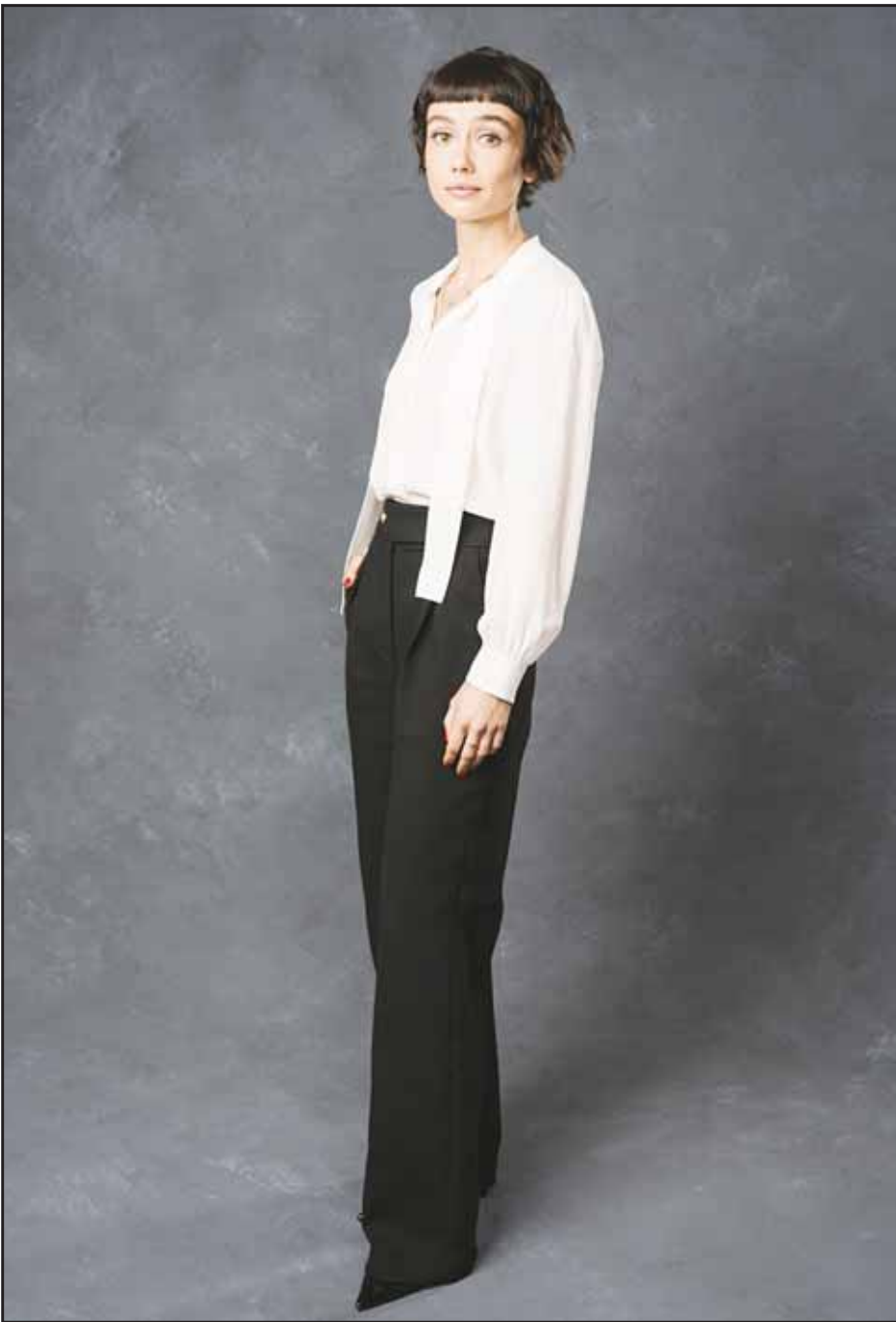
Sydney Chandler poses for a portrait to promote ‘Alien: Earth’ during Comic-Con International on Saturday, July 26, in San Diego.