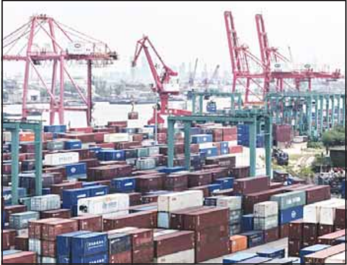
Machines loading containers at a container terminal, in Shanghai, China on Wednesday, May 14, 2025.