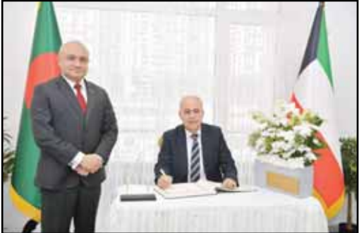
A diplomat signing the Book of Condolences.

Many others, who were unable to attend in person, conveyed their message of condolences electronically via official email of the Embassy. These heartfelt gestures of solidarity reflect the deep friendship and shared humanity among nations.