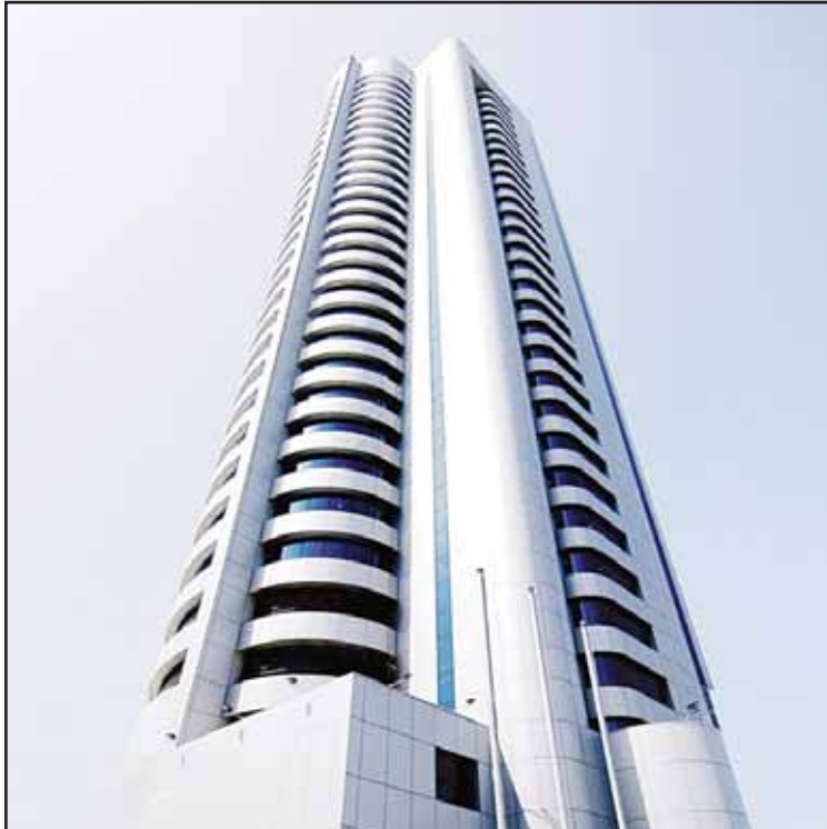
Warba Bank plans modern headquarters to support long-term growth.

productivity and innovation while delivering a superior experience for both employees and customers. This step is aligned with the Bank's vision to build a dynamic and human-centric infrastructure for the future.