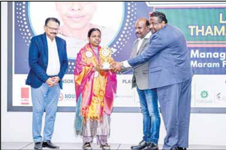
TEF Kuwait highlights engineering excellence at 5th seminar.