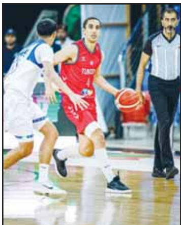
Players battling for the ball during Kuwait and Tunisia match.

Kuwait had opened its tournament campaign with a 79-87