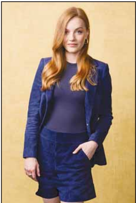
Harriet Slater poses for a portrait to promote ‘Outlander: Blood of My Blood.’