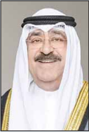
HH the Amir