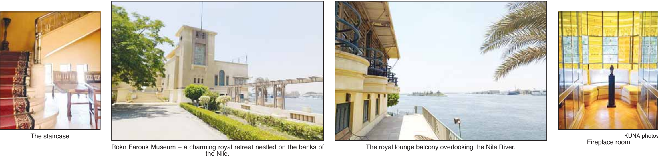
The staircase Rokn Farouk Museum – a charming royal retreat nestled on the banks of the Nile. The royal lounge balcony overlooking the Nile River. KUNA photos Fireplace room Egypt's Rokn Farouk Museum...captivating Nile-view rest house Lying along the Nile River in Cairo's western Helwan District, King Farouk's winter rest house known as Rokn Farouk Museum is an eye-catching royal architectural masterpiece that was built by the late king in 1942. Covering 11,600 m2, the museum, which is, in fact, is one of Cairo's hidden gems, was designed in the shape of a boat on the banks of the Nile. It consists of three entrances and berths designated for receiving royal yachts and large ships. The facility, which turned into a museum in 1979, embraces a ground floor that includes rooms and service units and the first floor that consists of a reception room, a large fireplace, a dining room and a bedroom. (KUNA)