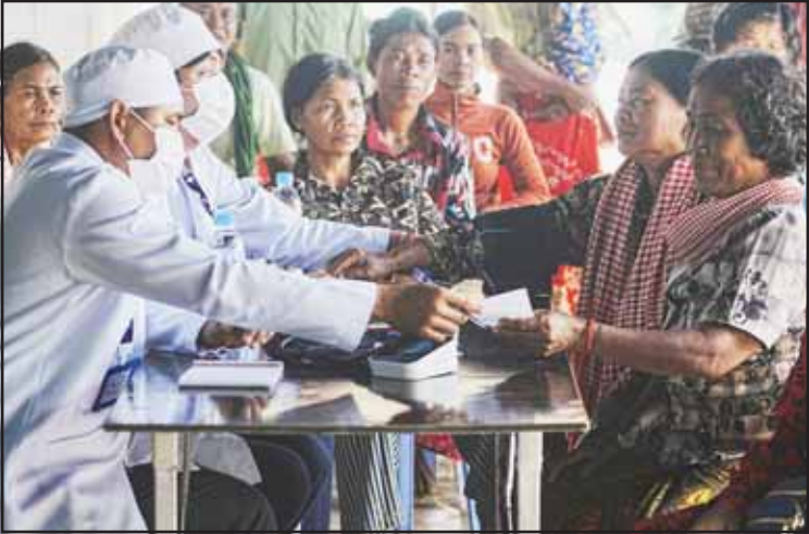
Cambodians evacuating villagers check their health at a health clinic, as they take refuge in Wat Phnom Kamboar In Oddar Meanchey province, Cambodia on July 27, as border fighting between Thailand and Cambodia entered its fourth day.

Both countries recalled their ambassadors and Thailand closed its border crossings with Cambodia. Despite the diplomatic efforts, fighting continued Sunday along parts of the contested border, with both sides refusing to budge and trading blame over renewed shelling and troop movements. Col Richa Suksowanont, a Thai army deputy spokesperson, said Cambodian forces fired heavy artillery into Surin province, including at civilian homes early