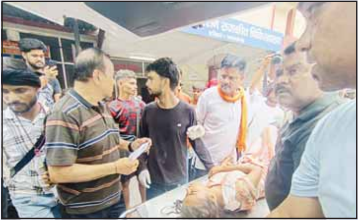
An injured from temple stampede is carried inside a hospital in Haridwar, India on July 27. (AP)

LUCKNOW, India, July 27, (AP): A crowd surge at a popular temple in northern India left at least six people dead and dozens injured, local authorities said Sunday. The incident in the pilgrimage city of Haridwar occurred after a high-voltage electric wire reportedly fell on a temple path, triggering panic among the large crowd of devotees. Vinay Shankar Pandey, a senior government official in Uttarakhand state where the incident happened, confirmed the deaths and said worshippers scrambled for safety following the incident. Some 29 people were injured, according to Haridwar city's senior police official Pramendra Singh Doval. Thousands of pilgrims had gathered at the Mansa Devi hilltop temple, which is a major site for devotees, especially on weekends and festival days, local officials said. Someone in the crowd shouted about an electric current on the pathway around 9 a.m. "Since the path is narrow and meant only for foot traffic, confusion and panic spread instantly," said local priest Ujjwal Pandit.