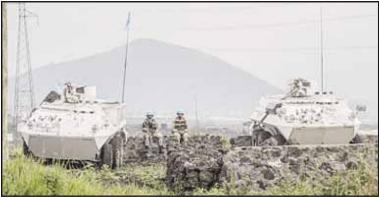
UN troops deploy outside Goma, Democratic Republic of Congo on Jan 24.