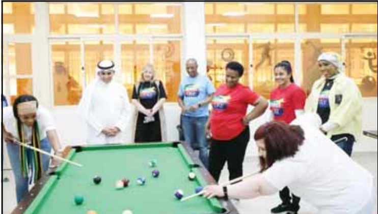
Engaging with women residents at the shelter through outdoor volleyball and indoor billiards - fostering connection and fun through sports and activities.