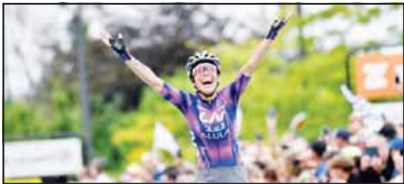
Spain's Mavi Garcia reacts as she crosses the finish line to win the second stage of the Women's Tour de France cycling race that starts in Brest to finish in Quimper, Brittany, western France.