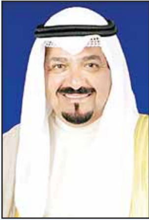
HH the Prime Minister