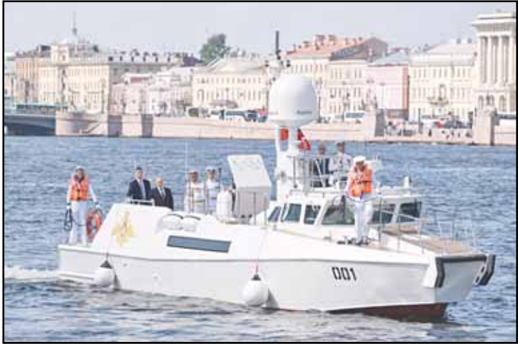
Russian President Vladimir Putin, (third from left), stands aboard the Raptor boat during his visit to St. Petersburg on Navy Day, Russia, on July 27.

MOSCOW, July 27, Russia on Sunday scaled down the festivities honoring its navy citing security concerns as continuing Ukrainian drone attacks posed a challenge to the Kremlin. Russian authorities canceled the parades of warships in St. Petersburg, in the Kaliningrad region on the Baltic and in the far-eastern port of Vladivostok that are usually held to mark the annual Navy Day celebrations. Asked about the reason for the cancellation of the parade in St. Petersburg even as President Vladimir Putin arrived in his home city to visit the navy headquarters, Kremlin spokesman Dmitry Peskov told reporters that "it's linked to the overall situation, security reasons, which are above all else." The Russian Defense Ministry said that air defenses downed 99 Ukrainian drones over several regions overnight. Later in the day, officials reported more drones shot down near St. Petersburg. A woman was injured by drone fragments in the Lomonosov region, according to the local authorities. St. Petersburg's Pulkovo airport suspended dozens of flights early Sunday because of the drone threat. On a trip to St. Petersburg, Putin visited the historic Admiralty building to receive reports on four-day naval maneuvers that wrapped up Sunday. The