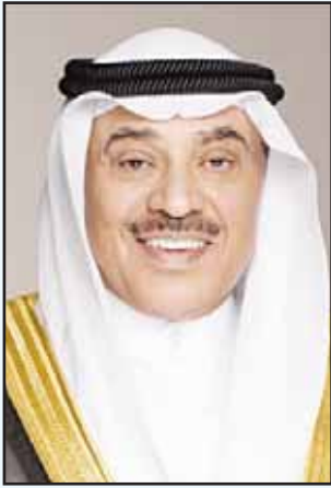
HH the Crown Prince