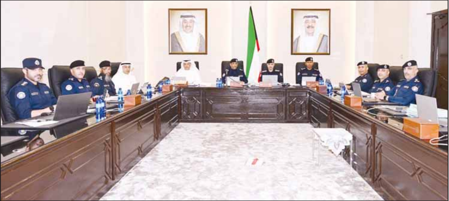
The selection committee members.

— Compiled by Mahmoud Attiyeh/ Simi K. Kutty