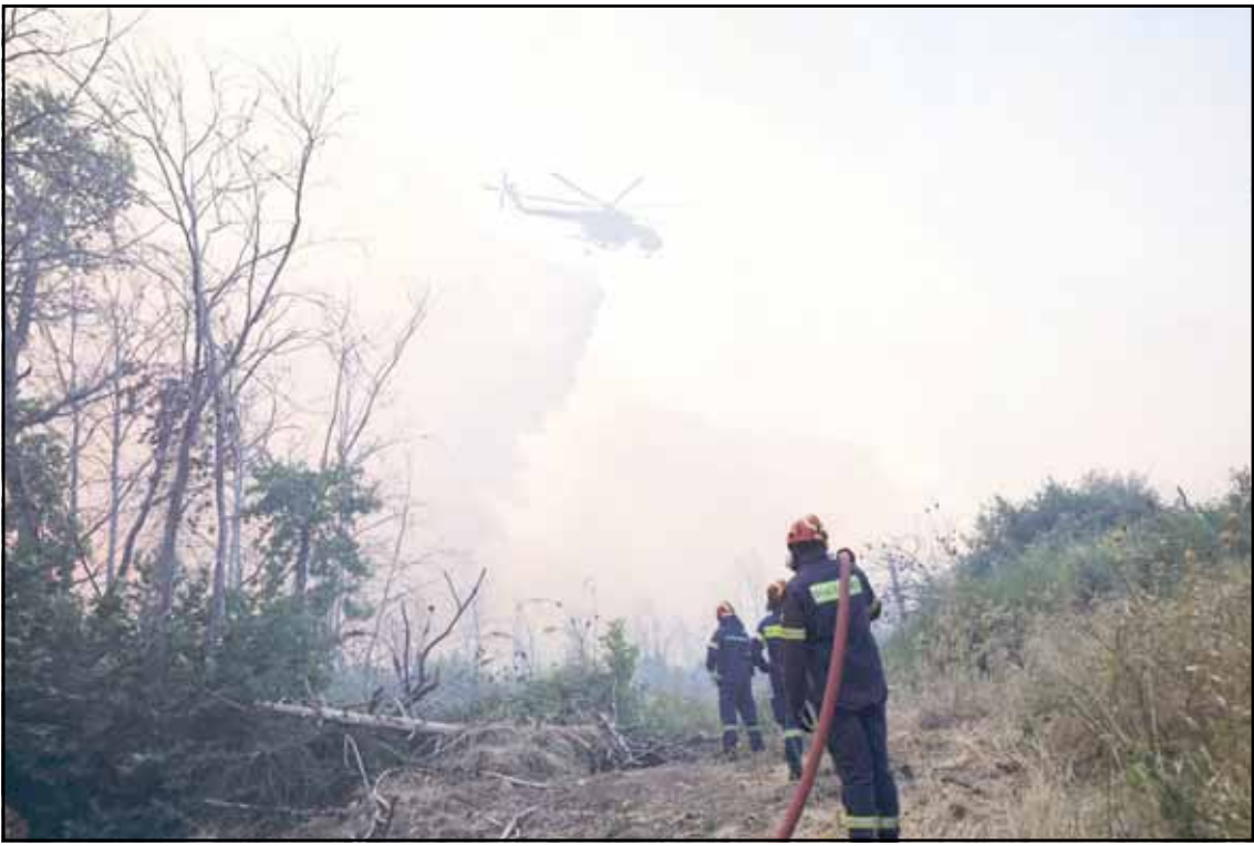
Firefighters try to extinguish the blazes in a forest as a helicopter drops water during a wildfire, in the northwestern suburb of Kryoneri, in Athens on Greece on July 26.