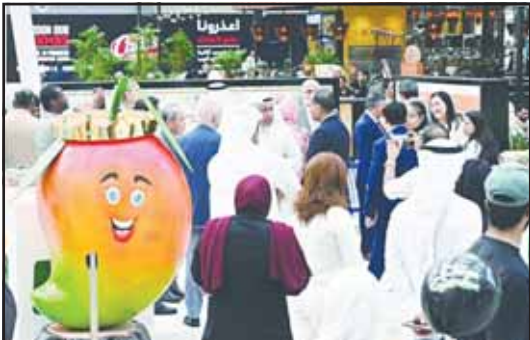
Top & above: Photos during a major promotional drive to showcase Indian mangoes and agricultural goods. Al-Seyassah photos

By Fares Ghaleb Al-Seyassah/Arab Times Staff