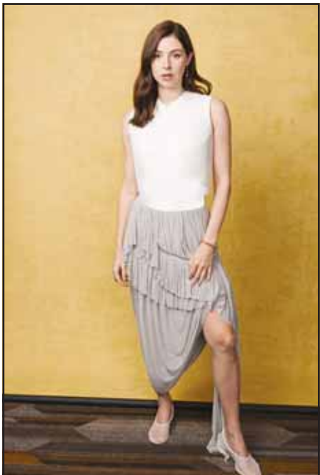
Hermione Corfield poses for a portrait to promote ‘Outlander: Blood of My Blood.’

from numerous Looney Tunes characters like Foghorn Leghorn, Tweety and Bugs Bunny, will be released on Aug. 28, 2026. Ketchup Entertainment teamed up with Warner Bros. on the film and in the release of “The Day the Earth Blew Up: A Looney Tunes Movie.”