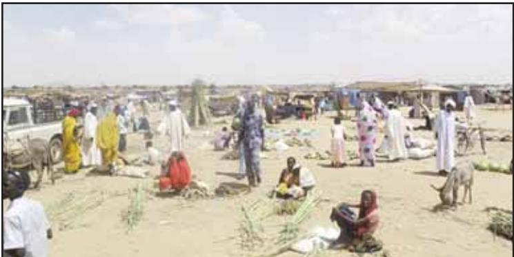
People prepare local crops of sugar cane and watermelons for sale, at Abu Shouk refugee camp, where they live on the outskirts of El Fasher, North Darfur, Sudan on Oct 8, 2010. (AP)

CAIRO, July 27, (AP): A notorious paramilitary group and its allies in Sudan said they formed a parallel government in areas under the group's control, which are located mainly in the western region of Darfur where allegations of war crimes and crimes against humanity are being investigated. The move, which was announced Saturday, was likely to deepen the crisis in Sudan, which plunged into chaos when tensions between the country's military and the paramilitary Rapid Support Forces, or RSF, exploded into fighting in April 2023 in the capital, Khartoum and elsewhere in the country. The RSF-led Tasis Alliance appointed Gen. Mohamed Hamdan Dagalo, the commander of the paramilitary group, as head of the sovereign council in the new administration. The 15-member council serves as head of the state. The RSF grew out of the notorious Janjaweed militias, mobilized two decades ago by then-president Omar al-Bashir against populations that identify as Central or East African in Darfur. The Janjaweed were accused of mass