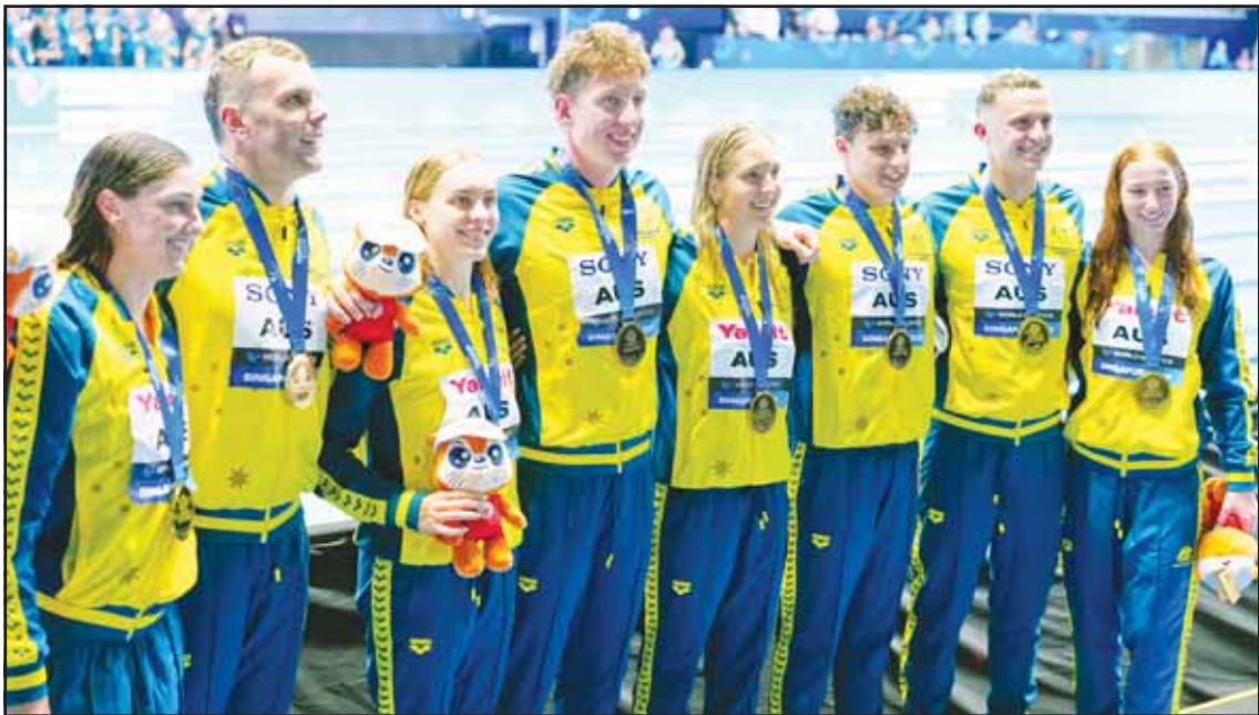
Gold medalists team Australia pose together after the men's and women's 4x100-meter freestyle finals at the World Aquatics Championships in Singapore.