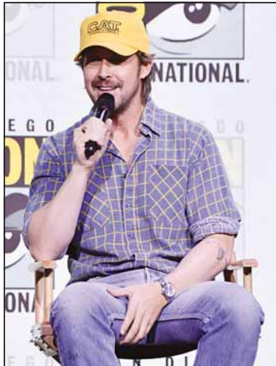
Ryan Gosling attends a panel for ‘Project: Hail Mary’ during Comic-Con International on Saturday, July 26, in San Diego.

“This movie is not a Mac, it’s a PC,” Lord said. “It can be beautiful, it just can’t be pretty.”