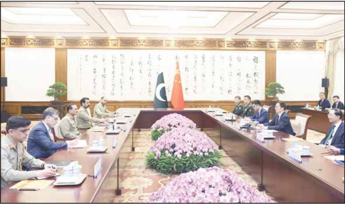
Chinese Vice President Han Zheng meets with Pakistani Chief of Army Staff Asim Munir in Beijing, capital of China on July 25.

Zhang Youxia, vice chairman of the Central Military Commission, on Friday expressed hope that Pakistan will continue to take all necessary measures to ensure the safety of Chinese personnel, projects and institutions in the country. Zhang made the remarks while meeting with Pakistani Chief of Army Staff Asim Munir. Noting that military-to-military relations between China and Pakistan serve as a crucial pillar of bilateral ties, Zhang called for efforts to strengthen strategic communication, deepen exchanges and cooperation, and work together to foster peace and development in the region. Munir said Pakistan stands ready to deepen and expand practical cooperation with China in all fields. He also stressed that Pakistan will make every effort to combat terrorism and protect the Chinese nationals in the country.