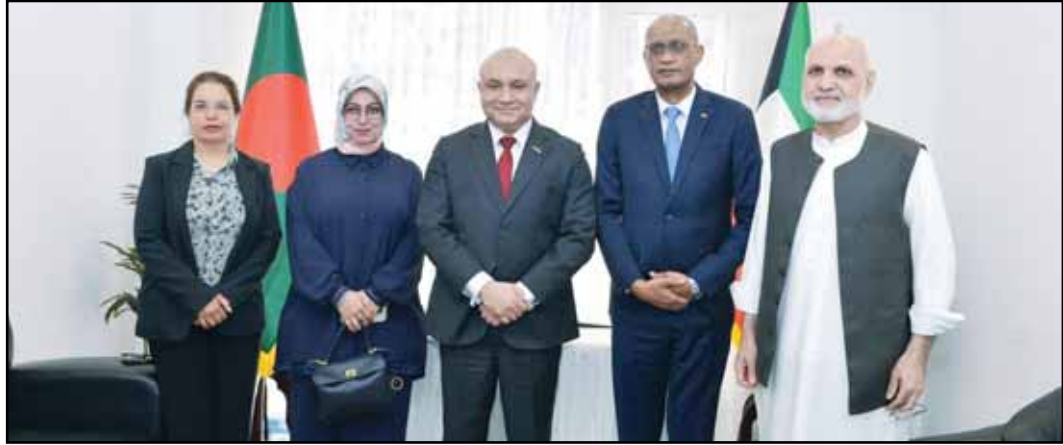
Diplomats during the signing of the Book of Condolences.

The Embassy is expressing its sincere gratitude to all dignitaries, diplomatic missions, and individuals who extended their condolences during this period of national mourning of Bangladesh.