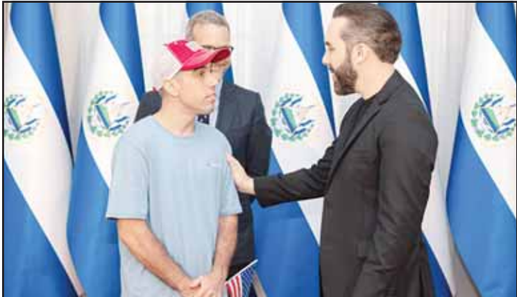
In this photo released by El Salvador's Presidential Press Office, President Nayib Bukele greets a US citizen who was released by the Venezuelan government, in San Salvador, El Salvador on July 18. (AP)

SAN SALVADOR, July 27, (AP): A labor rights group in El Salvador asked the country's Supreme Court to strike down a contentious "foreign agents" law promoted by President Nayib Bukele, which critics have said is intended to silence dissent. The law, passed in May, imposes a 30% tax on funds or donations received from foreign organizations, often a crucial source of funding for human rights, news and watchdog organizations that have repeatedly challenged the government. The passing of the law comes amid a wider crackdown by the government on dissent, which has forced more than a hundred people to flee the country in political exile in recent months. In addition to the steep tax, the law requires all organizations operating in the country that receive foreign funding to register with a new government body, which would have broad authority to determine compliance requirements. Critics say that would make it easier