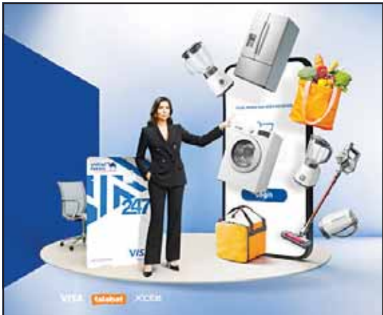
NBK 247 cardholders enjoy 24% off.

Additionally, Al-Ballam emphasized that the day of 247 stands as a token of appreciation from NBK to the NBK 247 Cashback Visa Platinum Prepaid cardholders and their continuous loyalty, further stressing that NBK