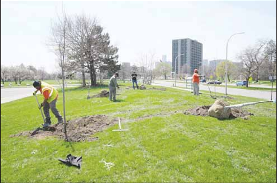
Workers plant a series of trees at the Coleman Young Community Center in Detroit.

However, like trees, cool roofs come with limits. Cool roofs work better on flat roofs than sloped roofs with shingles, as flat roofs