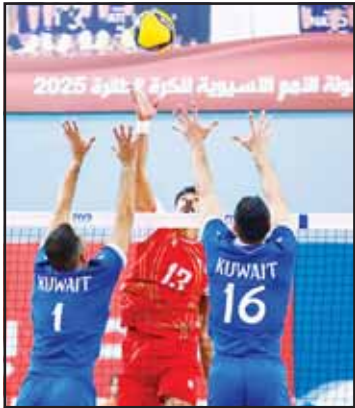
Players battling for the ball.