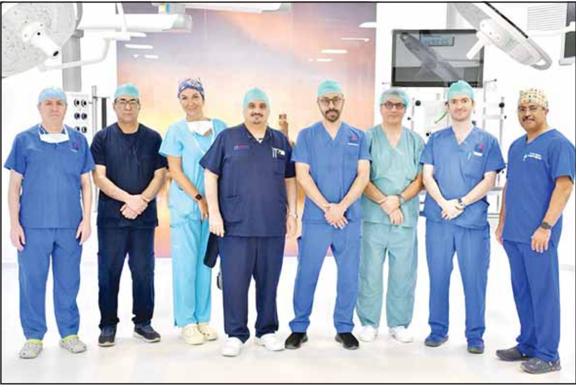
The medical team at Chest Diseases Hospital behind Kuwait's first minimally invasive coronary artery bypass surgery.