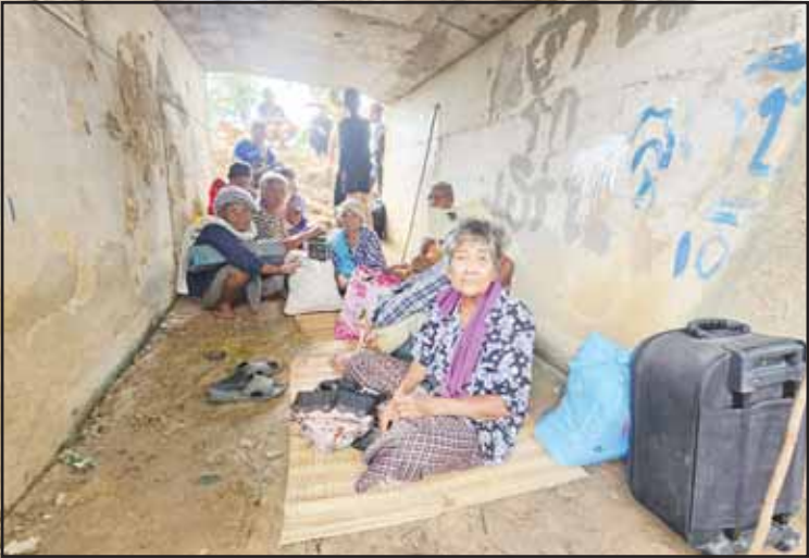
Thai people who fled clashes between Thai and Cambodian soldiers take shelter in Surin province, northeastern Thailand on July 24.

territorial integrity.” Cambodian Prime Minister Hun Manet wrote to the current president of the U.N. Security Council asking for an urgent meeting “to stop Thailand’s aggression.”