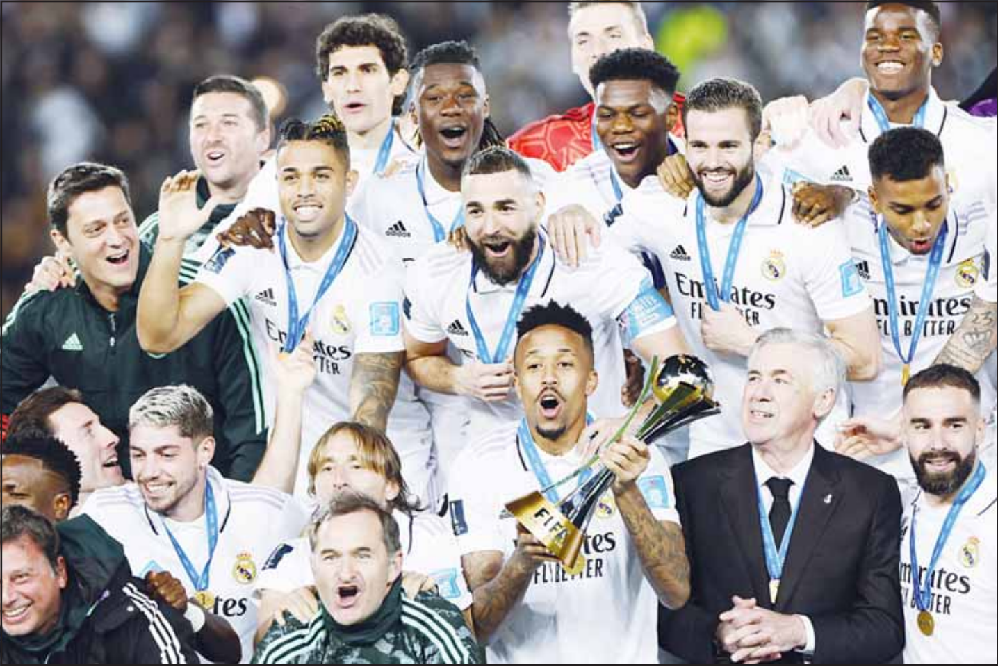
A file photo of Real Madrid players and coaches celebrating after winning the Club World Cup.

LONDON, July 24: FIFA is reportedly considering stripping several clubs — including record-holder Real Madrid — of the official “World Champion” title they earned under the previous Club World Cup format.