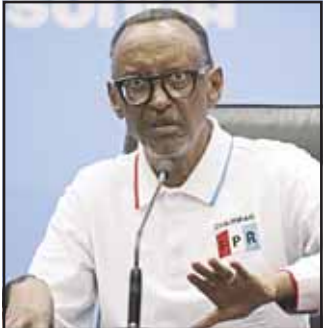
Rwanda’s President Paul Kagame gestures as he gives a press conference after his final election campaign rally at Kigali Convention Centre in Kigali, Rwanda on July 13, 2024.

KIGALI, July 24, (Xinhua): Rwandan President Paul Kagame appointed Justin Nsengiyumva as the new prime minister on Wednesday, paving the way for the formation of a new cabinet. Nsengiyumva, who served as deputy governor of the National Bank of Rwanda, replaced Edouard Ngirente, who had been prime minister since 2017 and was sacked Wednesday, according to a statement released by the office of the government’s spokesperson. In a post on X, Nsengiyumva thanked the president for the trust and confidence in him, pledging to serve the country with humility and dedication. “I fully embrace the responsibility entrusted to me and remain committed to advancing our national priorities with integrity and purpose. I will give all I have in me to help you (president) achieve your great vision for this country,” he said. According to Rwanda’s constitution, the appointment of a new prime minister paves the way for the formation of a new cabinet within 15 days. Meanwhile, a meeting of chief instructors from African command and staff colleges from 18 African