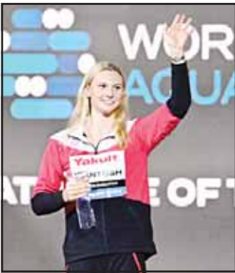
In this file photo, Canada's Summer McIntosh holds a trophy for the Athlete of the Year at the World Short Course Swimming Championships in Budapest, Hungary, on Dec. 15, 2024.

McIntosh dominates the two IM races, and should also be a favorite in the 200 butterfly.