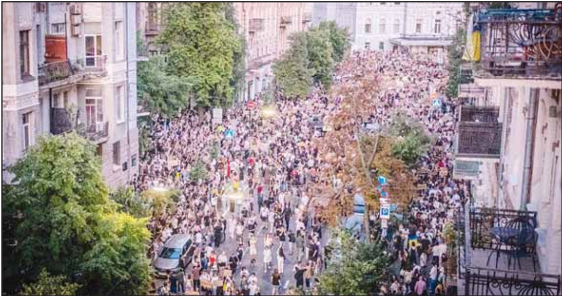
Thousands of people protest against a law targeting anti-corruption institutions near the President’s Office in Kyiv, Ukraine on July 23.

Aviation incidents have been frequent in Russia, especially in recent years as international sanctions have squeezed the country’s aviation sector.