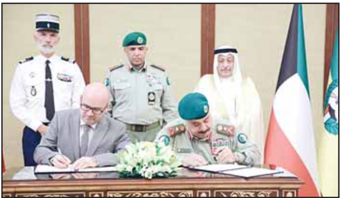
The Kuwait National Guard (KNG) and the French National Gendarmerie representatives signing the security agreement.