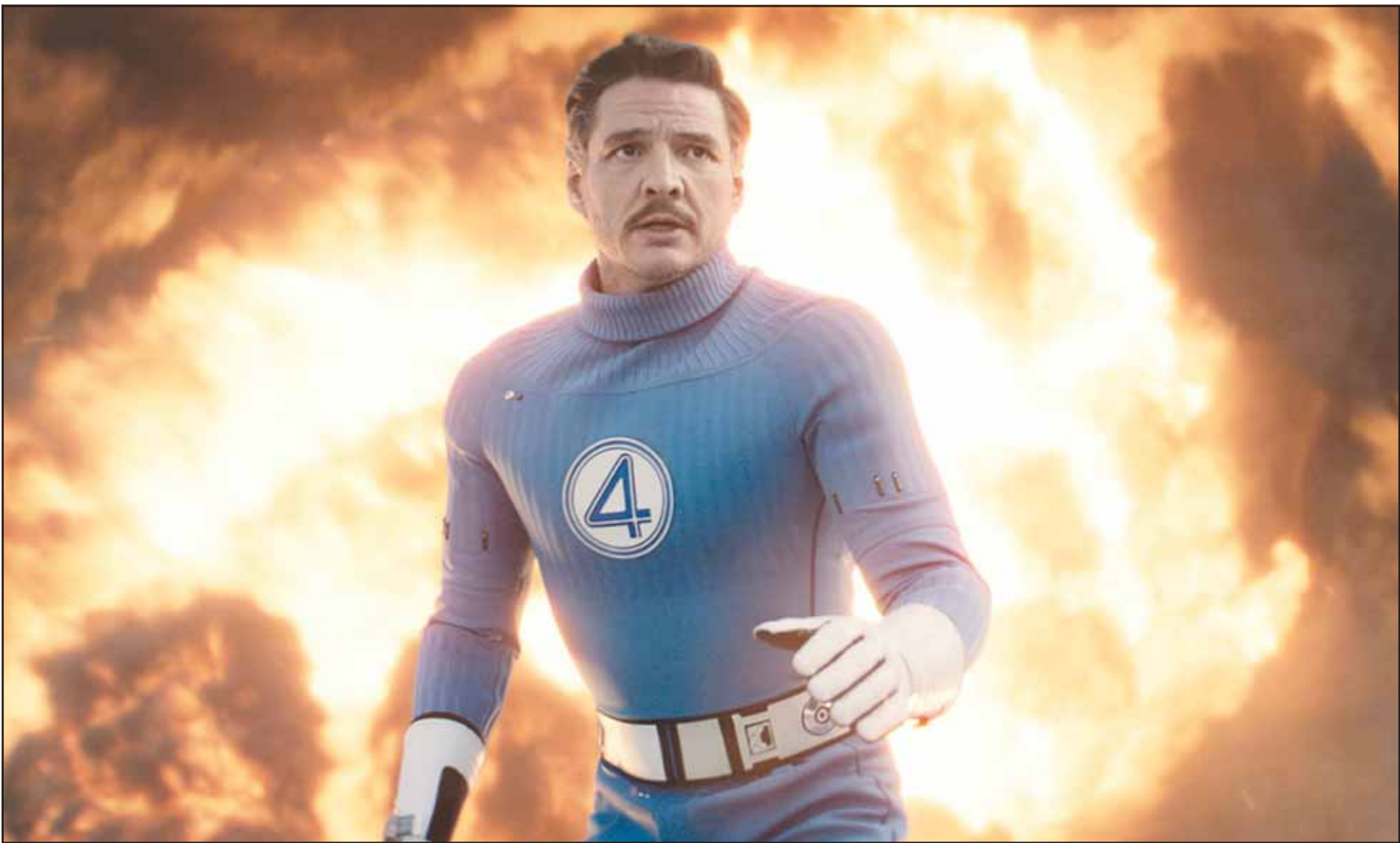
This image released by Disney shows Pedro Pascal in a scene from ‘The Fantastic Four: First Steps.’

‘Fantastic Four’ get long-awaited big screen debut