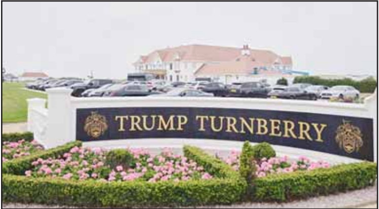
A general view of Trump Turnberry golf course in Turnberry, Scotland on July 23; US President Donald Trump is expected to visit Scotland in the next few days.

Fires have been reported in several municipalities, including Lapland’s capital, Rovaniemi – widely known as the “hometown of Santa Claus.” By Wednesday morning, five new wildfires had already been reported across the region. One of the largest, in the town of Kemijarvi, spanned approximately three hectares and had entered the monitoring phase by midday.