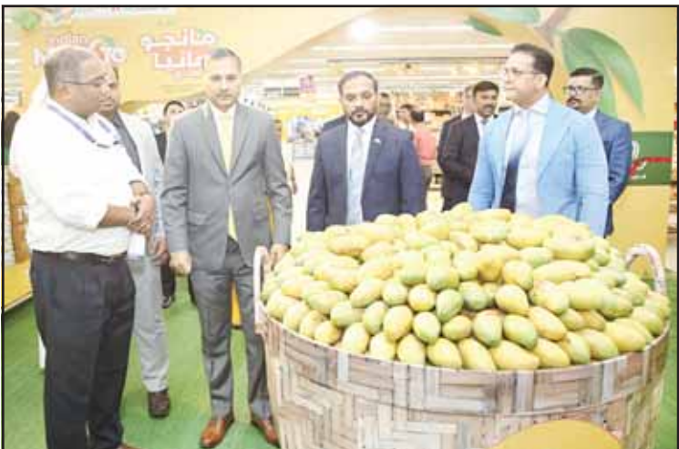
Indian Mango Fest opens at Lulu Hypermarket.

Six premium Indian mangoes featured at Lulu