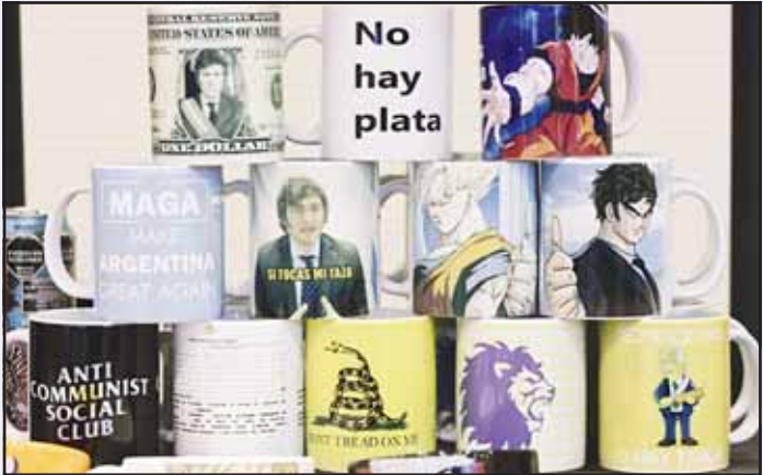
Mugs sit for sale at an event with President Javier Milei and supporters in Cordoba, Argentina on July 22.