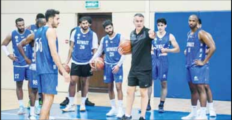
Players preparing for the championship.

As part of its preparation, the Kuwaiti held an external training camp in Turkey, where it played three friendlies against Algeria, Saudi Arabia, and Azerbaijan. The