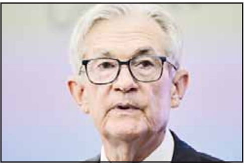
Federal Reserve Board Chairman Jerome Powell speaks during Federal Reserve Integrated Review of the Capital Framework for Large Banks Conference at the Federal Reserve in Washington, Tuesday, July 22, 2025.

WASHINGTON, July 24, President Donald Trump plans to step foot in the Federal Reserve on Thursday as his allies scrutinize its expensive building renovations, a highly personal and confrontational escalation of his campaign to pressure the central bank to slash interest rates.