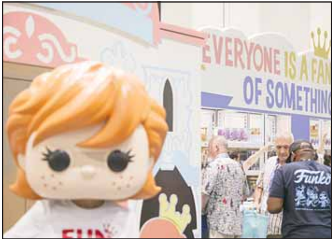
A general view of atmosphere during preview night for Comic-Con International on Wednesday, July 23, in San Diego.