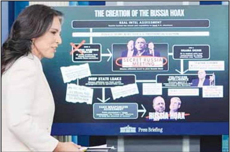
Director of National Intelligence Tulsi Gabbard walks to the podium to speak with reporters in the James Brady Press Briefing Room at the White House on July 23 in Washington.

pressed public doubts about Gabbard’s analysis of Iran’s nuclear program, appeared satisfied. He posted a video of her remarks, pinning them at the top of his social media feed.