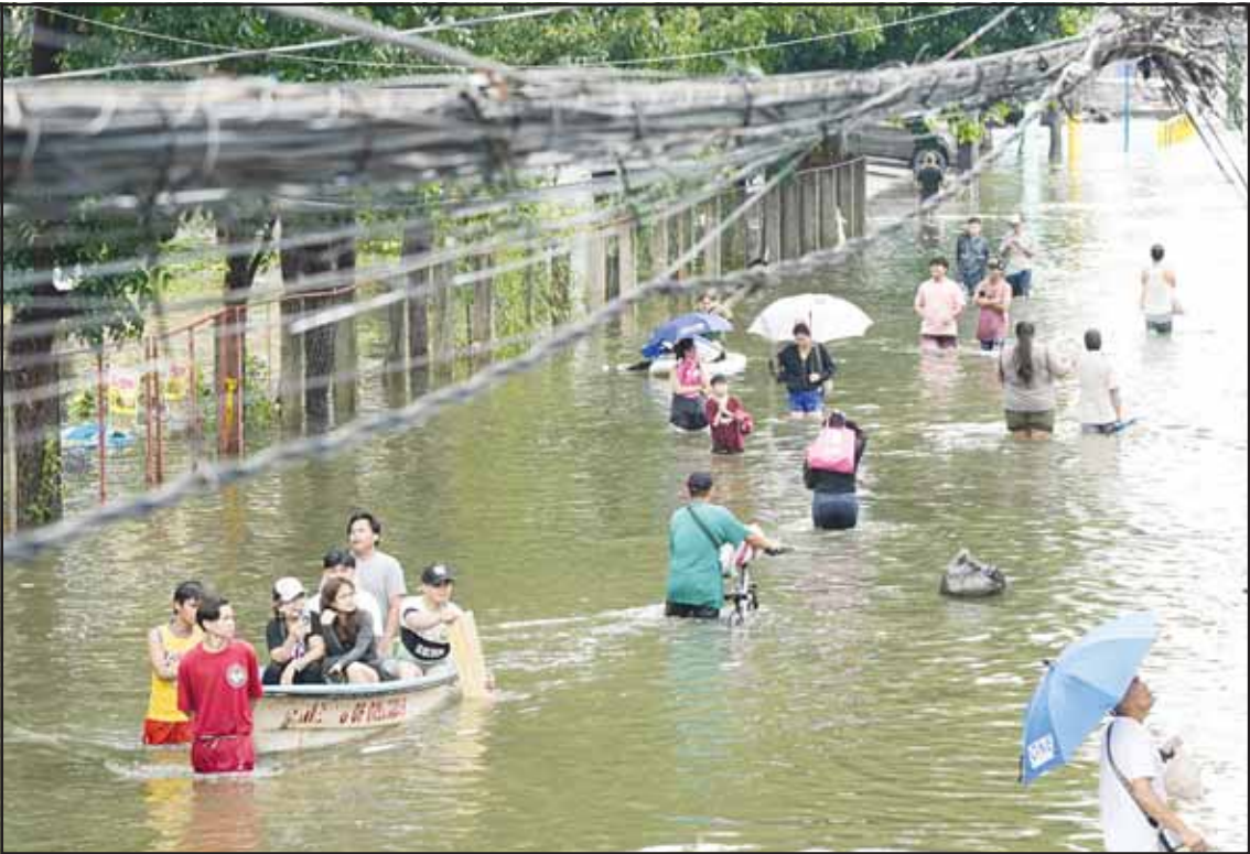
Residents negotiate floods after intense rainfall caused by the southwest monsoon in Cainta, Rizal province, Philippines on July 23.

Even with Wipha’s exit from the Philippines on Saturday, the southwest monsoon rain continued to fall due to two tropical storms, Francisco and Co-May, battering the country on Wednesday and Thursday. The Philippine weather bureau, PAGASA, said Thursday that Tropical Storm Co-May is expected to move southeastward before turning north-northeastward, possibly passing close to Pangasinan province in the afternoon and making landfall over the Ilocos Region by Thursday night or early Friday. Co-May may strengthen into a typhoon before landfall, the bureau added. Meanwhile, Tropical Storm Francisco continues to head west-northwestward and is expected to exit the Philippines on Thursday afternoon or evening. The bureau further warned that the enhanced monsoon will likely cause floods, landslides, and other weather-related hazards in affected areas. Flood warnings are in effect across Metro Manila and its adjoining provinces on Thursday. Co-May is the fifth tropical cyclone to hit the Philippines this year. An average of 20 typhoons lash the Philippines yearly. The archipelago is prone to tropical cyclones, which trigger heavy rains, flooding, and strong winds, resulting in casualties and destruction of crops and properties.