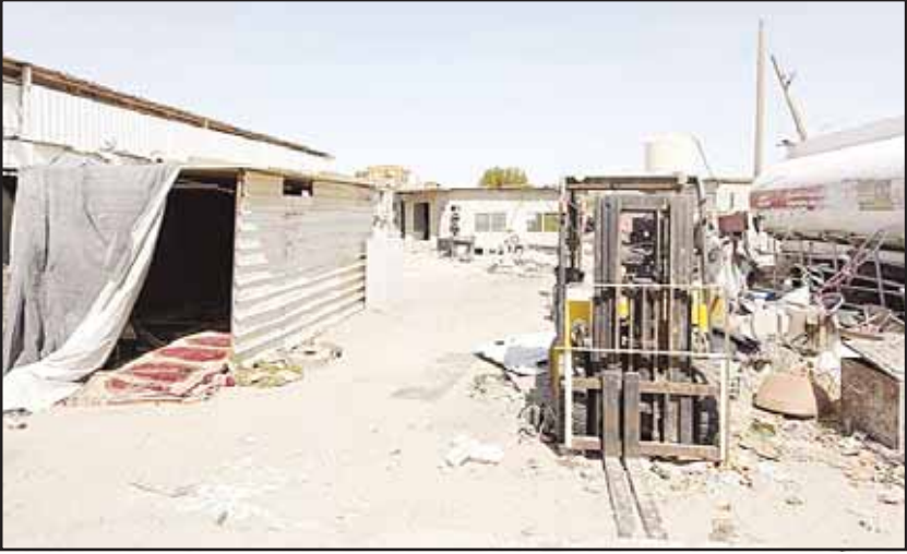
Wood is stored in Amghara scrapyard haphazardly.

Al-Saleh asserted that the attack is a serious criminal offense under Kuwaiti law and is totally inconsistent with ethical and societal values. “This assault not only targeted the two doctors personally, but also a blatant violation of the dignity of the health sector and the professional and job security of its workers. Such offense undermines the human and ethical principles upon which any civilized society is built.” She added “this assault is reprehensible as it occurred while the doctors were fulfilling their sacred duty to save lives and ease the suffering of others. Such an act is totally unacceptable.” She confirmed that all the necessary legal steps -- criminal and civil -- have been taken against the perpetrator.