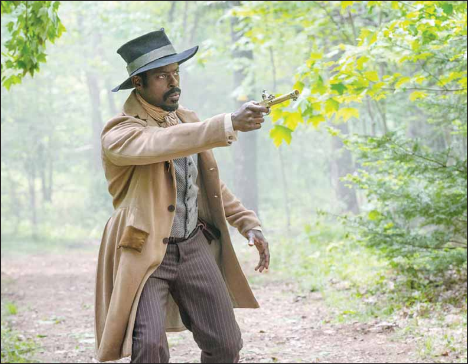
This image released by Disney shows Sterling K. Brown in a scene from ‘Washington Black.’

A journey from slavery to hope and freedom