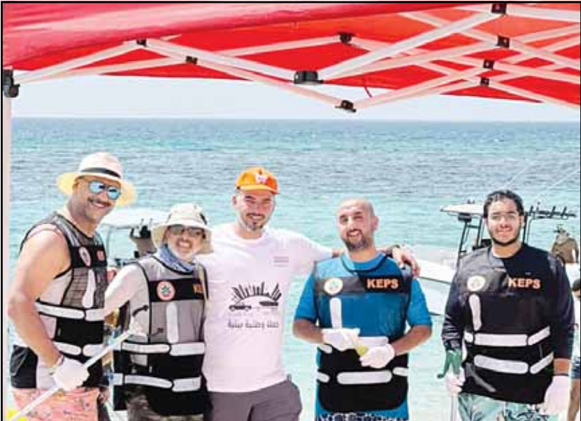
Volunteers from the Kuwait Environment Protection Society participate in a beach clean-up campaign on Umm Al Maradem Island.