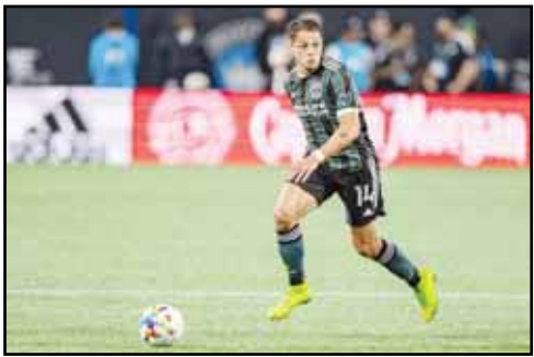
In this file photo, LA Galaxy forward Javier ‘Chicharito’ Hernandez in action at MLS soccer match against the Charlotte FC in Charlotte, N.C.

“I’m a mother, I’m a grandmother, I’m also a housewife,” the president added Wednesday. “But I’m also the Supreme Commander of the Armed Forces. Women can be whatever we want.”