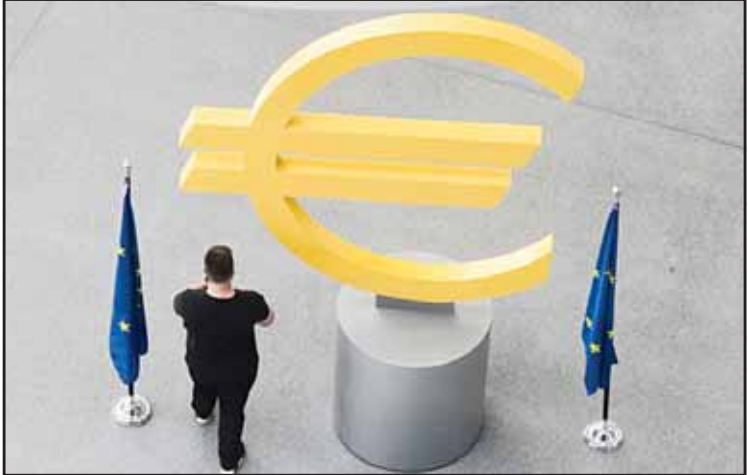
A person walks past a Euro logo, at the European Central Bank headquarters, in Frankfurt, Germany, Thursday, July 24, 2025.

FRANKFURT, July 24, The European Central Bank has left interest rates unchanged as it waits to see how big a blow U.S. President Donald Trump's tariffs will inflict on the economy before deciding whether to cut rates again. The bank's governing council announced Thursday at its skyscraper headquarters in Frankfurt that it would leave its benchmark deposit rate at 2%. "The economy has so far proven resilient overall in a challenging global environment," said bank President Christine Lagarde at her post-decision news conference. "At the same time, the environment remains exceptionally uncertain, especially because of trade disputes." The ECB has already cut rates eight times since June of last year. The monetary authority for the 20 countries that use the euro currency has been lowering rates to support growth after raising them in 2022-2023 to snuff out inflation caused by Russia's invasion of Ukraine and the rebound after the pandemic. With the bench mark rate now at 2%, down from a record high of 4%, analyst think there could be one more rate cut coming, but only in September. The reason, say analysts: The ECB's policymakers simply don't know the outcome of talks between the EU's executive commission and the Trump