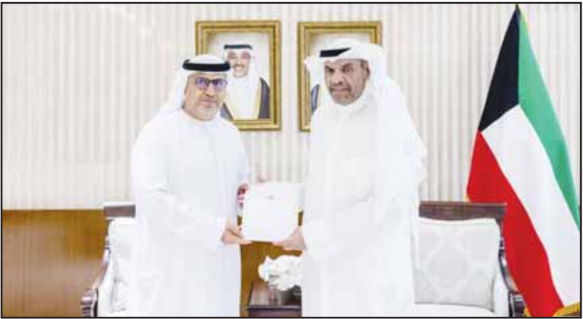
Foreign Minister Abdullah Al Yahya receives a written message from UAE Minister of State for Youth Affairs Dr. Sultan Al Neyadi.