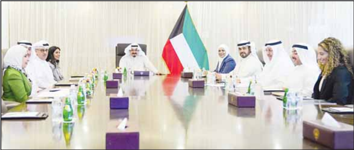
His Highness the Prime Minister Sheikh Ahmad Abdullah Al-Ahmad Al-Sabah discusses Kuwait-China agreements signed with China.

Scan the QR code to access the Arab Times WhatsApp Channel