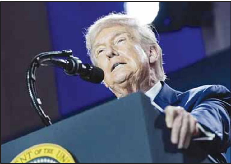
US President Donald Trump speaks during an AI summit at the Andrew W. Mellon Auditorium on July 23, in Washington.

But the 9th Circuit majority found that the case fell under one of the exceptions left open by the justices. The case was filed by a group of states who argued that