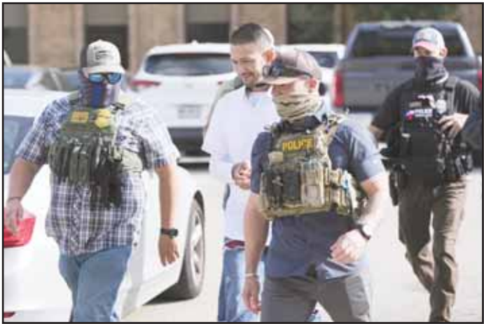
Federal agents escort a man to a transport bus after he was detained following an appearance at immigration court on July 22, in San Antonio.

President Donald Trump recently signed a law setting aside $170 billion on border and immigration enforcement, including $45 billion for detention, even as the number of illegal border crossings has plunged. ICE will see its funding grow by $76.5 billion over five years, nearly 10 times its current annual budget.