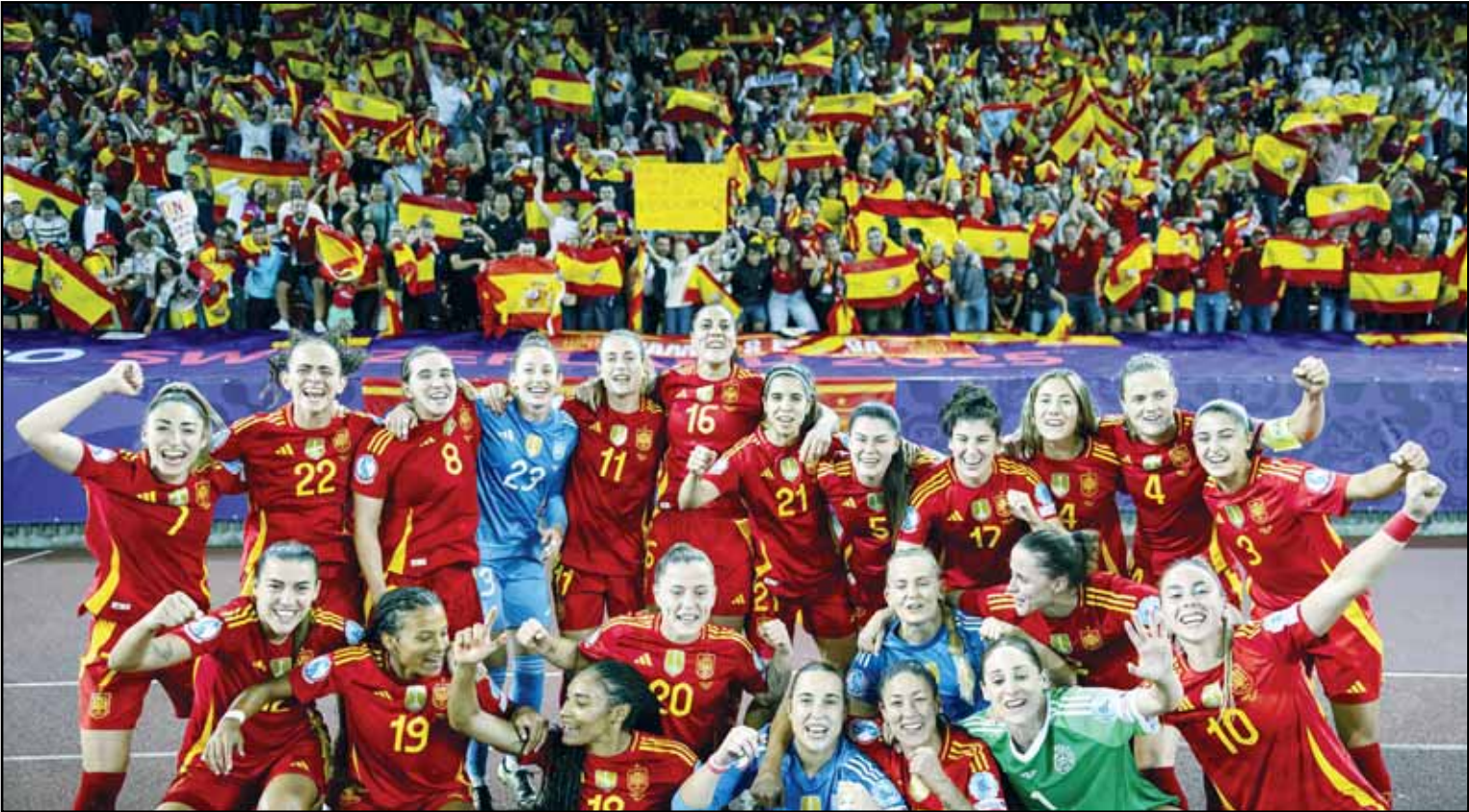
Spain's team cheers after winning the Women's Euro 2025 semifinal soccer match between Germany and Spain at the Letzigrund stadium in Zurich, Switzerland.

Germany managed to stifle Spain's attack, which didn't have a real sight of