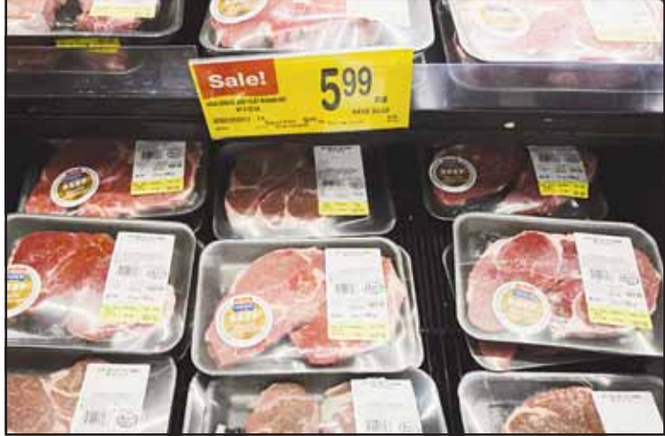
A price for beef is displayed on a shelf at a grocery store in Mount Prospect, Ill., Thursday, July 17, 2025.

Mexico and Canada to their farms of origin. Australian authorities were "satisfied the strengthened control measures put in place by the U.S. effectively manage biosecurity risks," Collins said. The timing of the new, reduced restrictions has not been finalized. Trump attacked Australian import restrictions on U.S. beef when he announced in April that tariffs of at least 10% would be placed on Australian imports, with steel and aluminum facing a 50% tariff. "Australia bans - and they're wonderful people, and wonderful everything - but they ban American beef," Trump told reporters then. "Yet we imported $3 billion of Australian beef from them just last year alone. They won't take any of our beef. They don't want it because they don't want it to affect their farmers and, you know, I don't blame them, but we're doing the same thing right now," Trump added. Opposition lawmaker David Littleproud suspected the government was endangering Australia's cattle