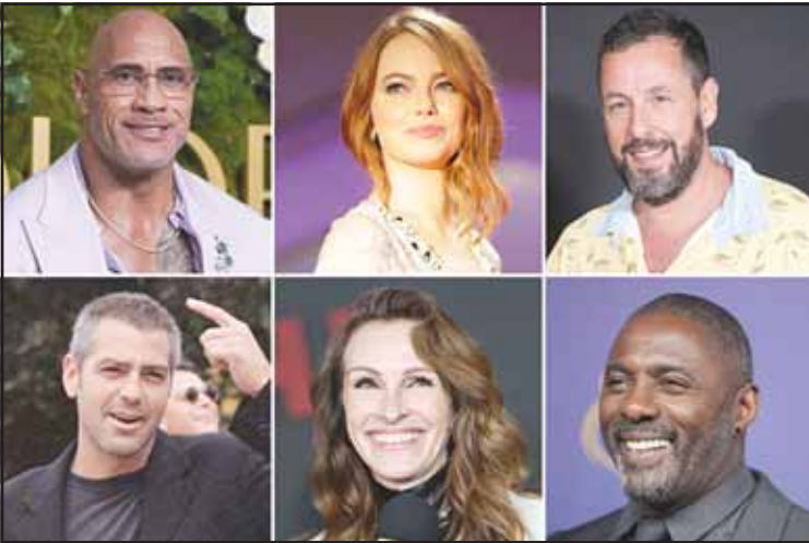
This photo combination shows, (from top left), Dwayne Johnson, Emma Stone, and Adam Sandler. (From bottom left), George Clooney, Julia Roberts, and Idris Elba.

Also in competition are Kathryn Bigelow’s “A House of Dynamite,” a political thriller about an imminent missile strike on the US, starring Idris Elba and Rebecca Ferguson, and Jim Jarmusch’s anthology film “Father Mother Sister Brother,” with Cate Blanchett and Adam Driver. Many master filmmakers are also in the section: Park Chan-wook will debut “No Other Choice”; László Nemes has his most personal film yet in “Orphan”; and François Ozon takes on an Albert Camus adaptation with “L’Étranger.”