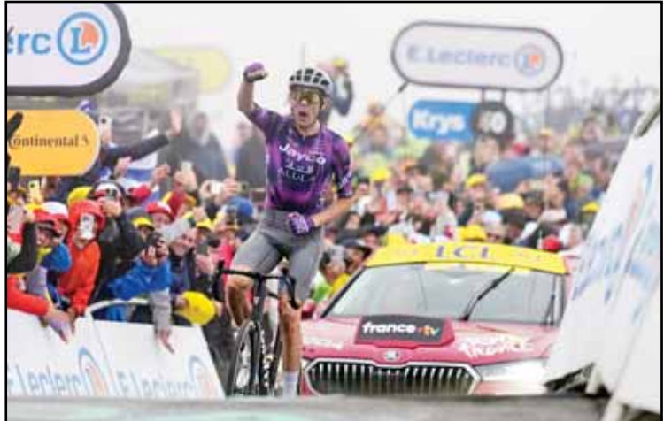
Australia's Ben O'Connor crosses the finish line to win the eighteenth stage of the Tour de France cycling race over 171.5 kilometers (106.6 miles) with start in Vif and finish in Courchevel Col de la Loze, France.

Stage 18 featured three extremely difficult ascents, including the 26.4-kilometer (16.5-mile) daunting climb of the Col de La Loze up to the finish. At 2,304 meters of altitude, La Loze is the highest sum-