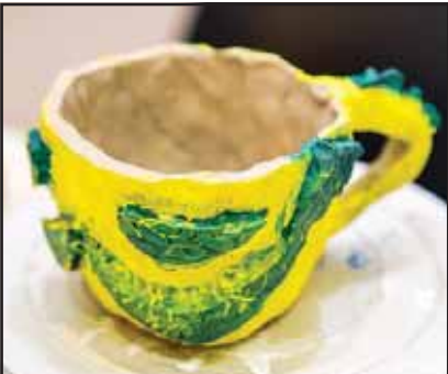
Ceramic piece by one of the participating children.