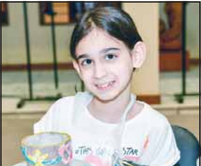
A child displays her artwork.