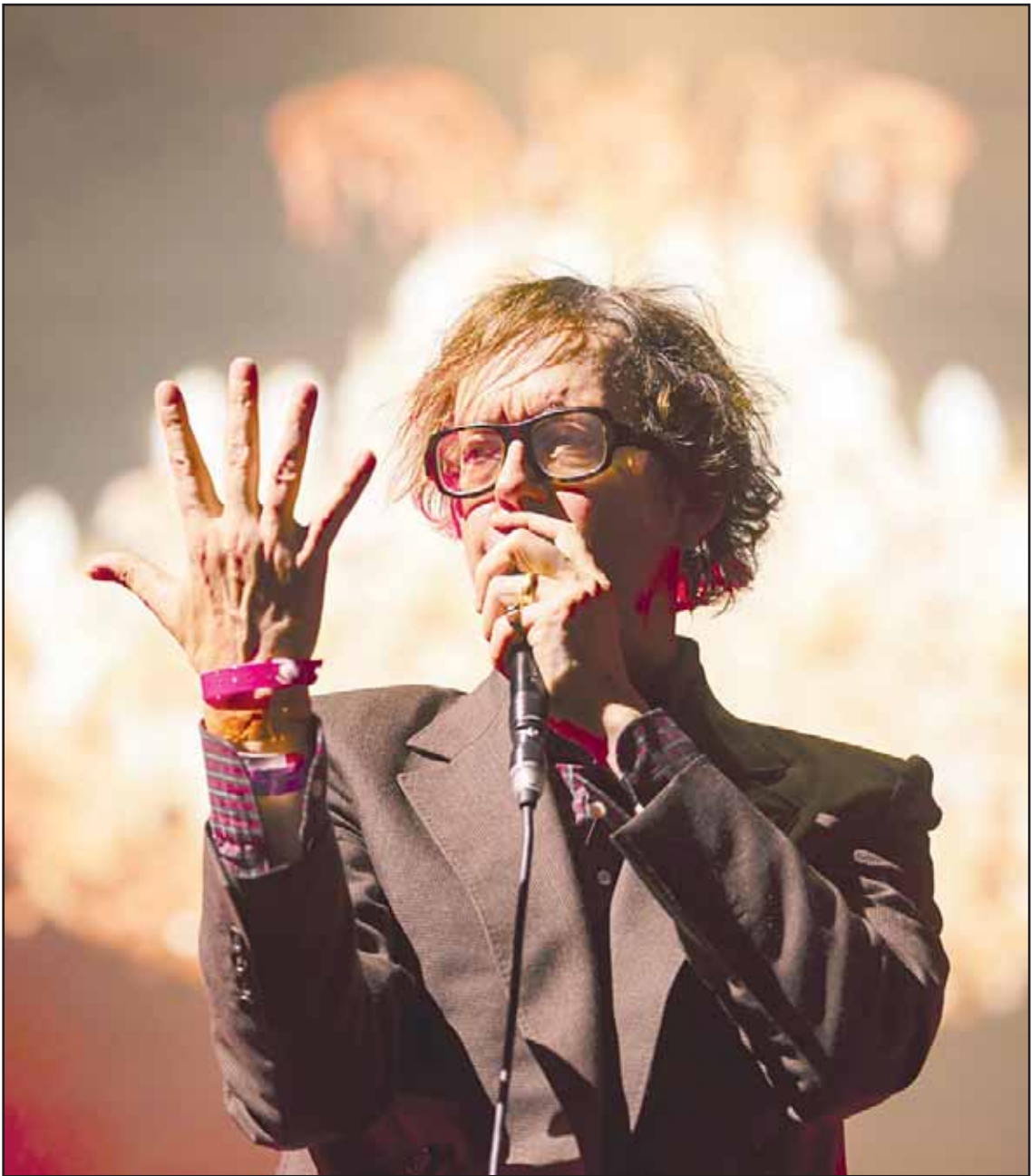
Singer Jarvis Cocker from the British music group Pulp performs on the Lake stage during the 59th Montreux Jazz Festival (MJF), in Montreux, Switzerland, Monday, July 14.