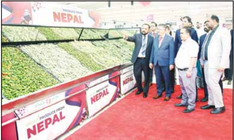
Nepal's envoy, embassy staff and Lulu management attend the launch.