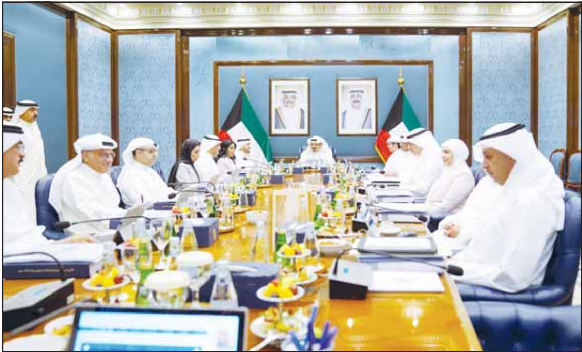
His Highness the Prime Minister Sheikh Ahmad Abdullah Al-Ahmad Al-Sabah chairs the weekly Cabinet meeting on Tuesday.