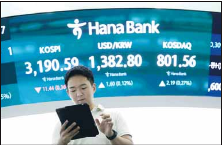
A currency trader works near a screen showing the Korea Composite Stock Price Index (KOSPI), top left, and the foreign exchange rate between U.S. dollar and South Korean won, top center, at the foreign exchange dealing room of the Hana Bank headquarters in Seoul, South Korea, Tuesday, July 15, 2025.

TOKYO, July 15, Shares were mostly higher in Europe on Monday following gains in Asian markets despite lingering worries about President Donald Trump’s latest updates to his tariffs. Shares in tech giant Nvidia jumped 5.2% in pre-market trading after its CEO said the Trump administration will let it sell to China its advanced H20 chips used to develop artificial technology. Germany’s DAX gained 0.3% to 24,222.95 and the CAC 40 in Paris was up less than 0.1% at 7,812.14. Britain’s FTSE 100 was nearly unchanged at 8,996.90. The future for the S&P 500 gained 0.4% while that for the Dow Jones Industrial Average slipped 0.1%. In Asian trading, Japan’s benchmark Nikkei 225 rose 0.6% to finish at 39,678.02. A nationwide election for the upper house of Japan’s Parliament, set for Sunday, also added to the wait-and-see attitude among market players. Analysts say the ruling pro-business Liberal Democratic Party may face an uphill battle and will likely need coalition partners, including possibly new ones, to keep its grip on power. Australia’s S&P/ASX 200 added 0.7% to 8,630.30. South Korea’s Kospi edged up 0.4% to 3,215.28. Hong Kong’s Hang Seng rose 1.6% to 24,590.12, while the Shanghai Composite dipped 0.4% to 3,505.00, after the government reported that China’s economy slowed in the last quarter as Trump’s trade war escalated. Tuesday’s data showed the econ