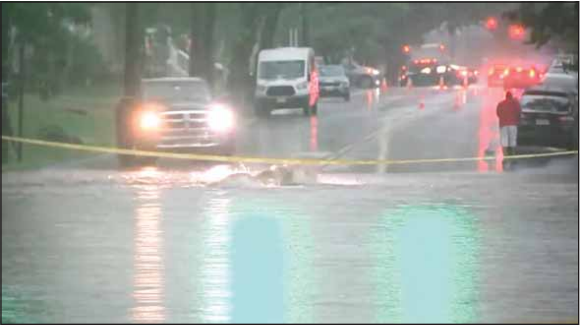
This image made from video shows a flooded street in Rahway, NJ on July 14.