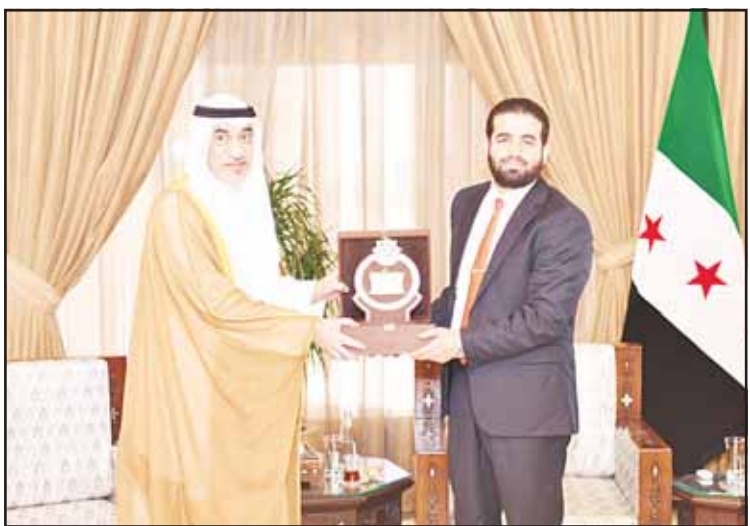
Kuwait's First Deputy Prime Minister and Interior Minister Sheikh Fahad Yousef Saud Al-Sabah with Syrian Interior Minister Anas Khattab.