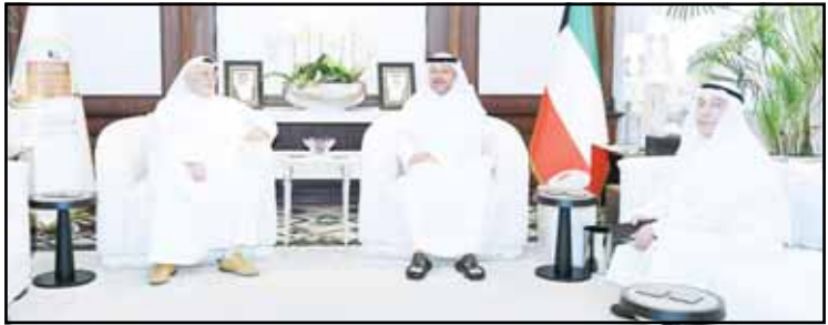
Farwaniya Governorate photo