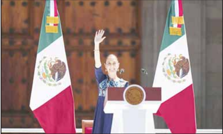
Mexico’s President Claudia Sheinbaum waves to supporters at a rally she convened to welcome US President Donald Trump’s decision to postpone tariffs on Mexican goods for one month at the Zocalo, Mexico City’s main square on March 9.

MEXICO CITY, July 15, (Xinhua): Mexican President Claudia Sheinbaum has called on the United States to do more to curb drug and arms trafficking across the border as Washington threatens tariff hikes on Mexico. US President Donald Trump on Saturday threatened to impose a 30-percent tariff on Mexican imports starting from Aug. 1 in a letter addressed to Sheinbaum, accusing Mexico of failing to stop drug trafficking and illegal immigration to the United States. Sheinbaum on Monday hit back at the criticism, calling on the United States to redouble its efforts to curb drug and arms trafficking on its own turf. “We do our part and they also have to do their part,” she said at her daily press conference. “There is collaboration. There is coordination.” Sheinbaum noted she hopes to reach a deal with the United States to avoid Trump’s proposed 30 percent tariff. “We believe ... that we will reach an agreement with the United States government -- and that we will, of course, reach better terms,” Sheinbaum said. Mexico sent a government delega-