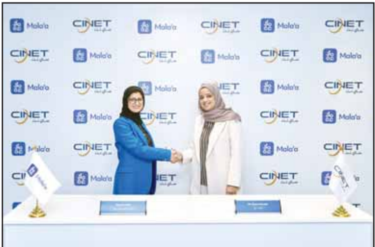
CINET and Mala'a formalize Gulf credit data partnership.

Meanwhile, the Major 50 Index managed a slight uptick, rising 4.76 points, or 0.06 percent, to end the session at 7,427.08. Trading on this index totaled 558.4 million shares across 16,967 transactions, with a market value of approximately 54.6 million dinars, or about 178.7 million dollars.