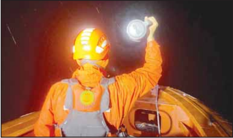
This photo taken with a mobile phone on July 14, 2025 shows a rescuer holding a flashlight during a search and rescue mission after a speedboat capsized off the coast of the Mentawai Islands in Indonesia’s West Sumatra province.

JAKARTA: Seven people have died after a pickup truck carrying 20 people plunged into a ravine in a hilly area in the Indonesian province of South Sulawesi last Saturday, local media reported on Tuesday.