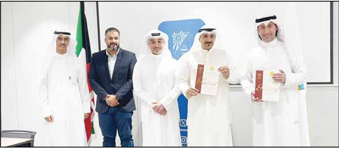
Kuwait University honors faculty members for innovations advancing research, sustainability, and Kuwait Vision 2035.