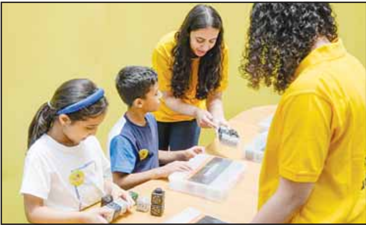
Zain's young ambassadors helped supervise the workshops.