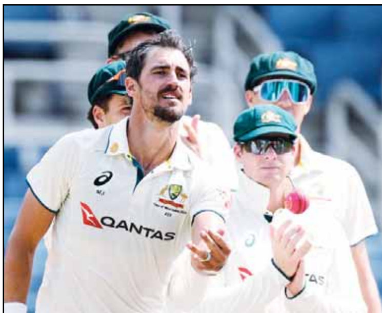
Australia's Mitchell Starc celebrates after dismissing West Indies' Mikyle Louis to claim his 400th wicket in Test cricket on day three of the third Test match at Sabina Park in Kingston, Jamaica.

"I don't think we imagined it was going to happen as quickly as it did, but when you've got an attack like ours, some things can happen like that."