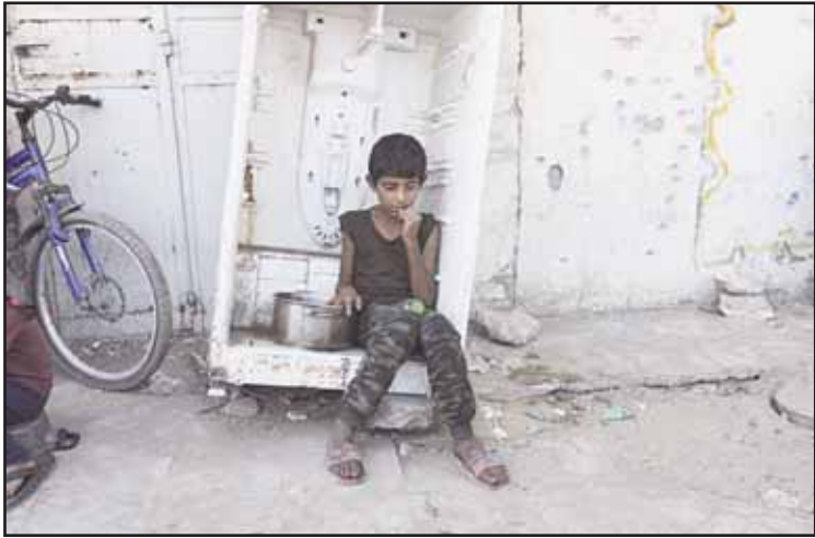
A Palestinian child waits for donated food at a community kitchen in Gaza City, in the northern Gaza Strip, Monday, July 14.