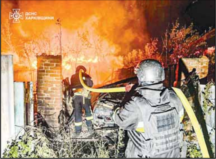
In this photo provided by the Ukrainian Emergency Service, firefighters try to put out a fire following a Russian attack in Kharkiv region, Ukraine on July 15. (AP)