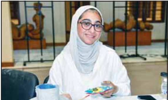
A young participant sharing her ceramic work.