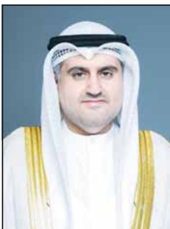
Minister of Justice and Chairman of the Permanent National Committee for International Humanitarian Law Counselor Nasser Al-Sumait.

In a statement to the Kuwait News Agency (KUNA), Al-Sumait explained that the ministry,