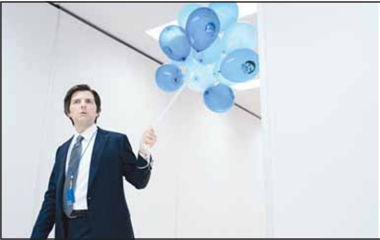
This image released by Apple TV+ shows Adam Scott in a scene from 'Severance.'

Apple TV+'s Hollywood satire "The Studio" could draw a host of comedy