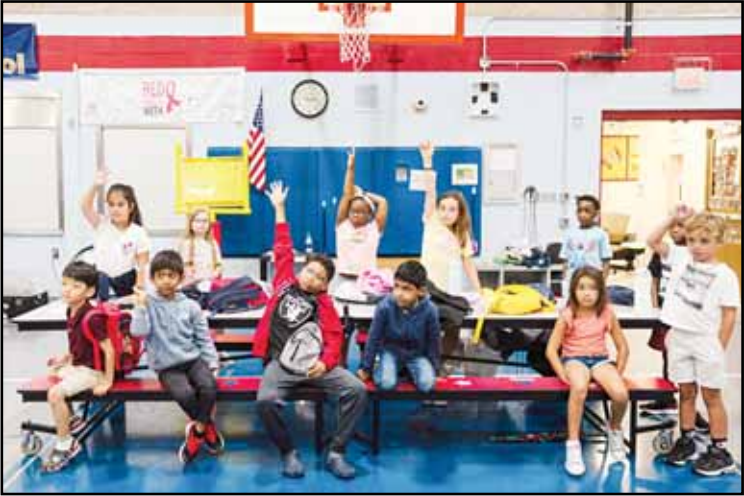
Children raise their hands while participating in activities during the East Providence Boys and Girls Club Summer Camp at Emma G. Whiteknact Elementary School on July 10, in Providence RI.

“Without explaining to the American people its reasoning, a majority of justices on the U.S. Supreme Court have dealt a devastating blow to this nation’s promise of public education