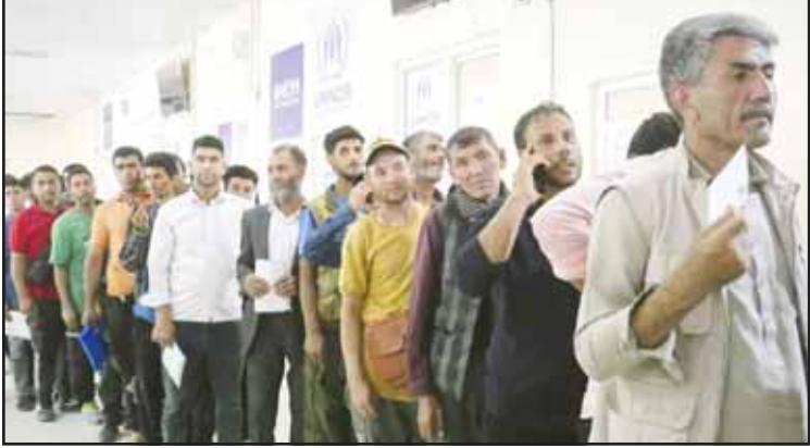
Afghan refugees who returned after fleeing Iran to escape deportation and conflict line up at a UNHCR facility near the Islam Qala crossing in western Herat province, Afghanistan, on June 20. (AP)

WASHINGTON, July 15, (AP): An appeals court late Monday stepped in to keep in place protections for nearly 12,000 Afghans that have allowed them to work in the US and be protected from deportation after they were set to expire as part of the Trump administration’s efforts to make more people eligible for removal from the country. The Department of Homeland Security in May said it was ending Temporary Protected Status for 11,700 people from Afghanistan in 60 days. That status had allowed them to work and meant the government couldn’t deport them. CASA, a nonprofit immigrant advocacy group, sued the administration over the TPS revocation for Afghans as well as for people from Cameroon - those expire August 4. A federal judge last Friday allowed the lawsuit to go forward but didn’t grant CASA’s request to keep the protections in place while the lawsuit plays out. CASA appealed the case Monday and won a stay keeping in place the temporary status for Afghans that was set to expire Monday. The appeals