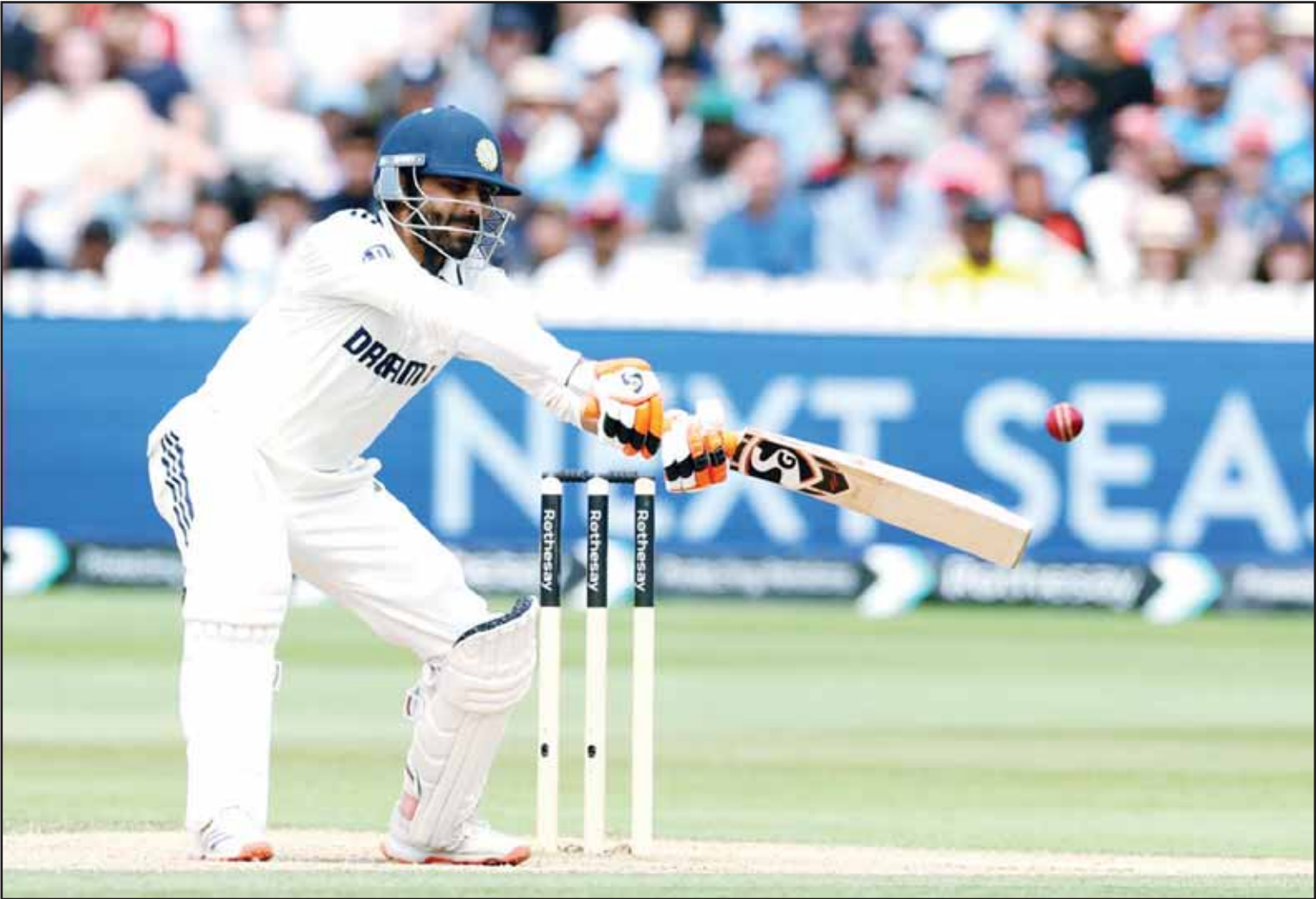
India’s Ravindra Jadeja plays a shot during the fifth day of the third cricket test match between England and India at Lord’s cricket ground in London.