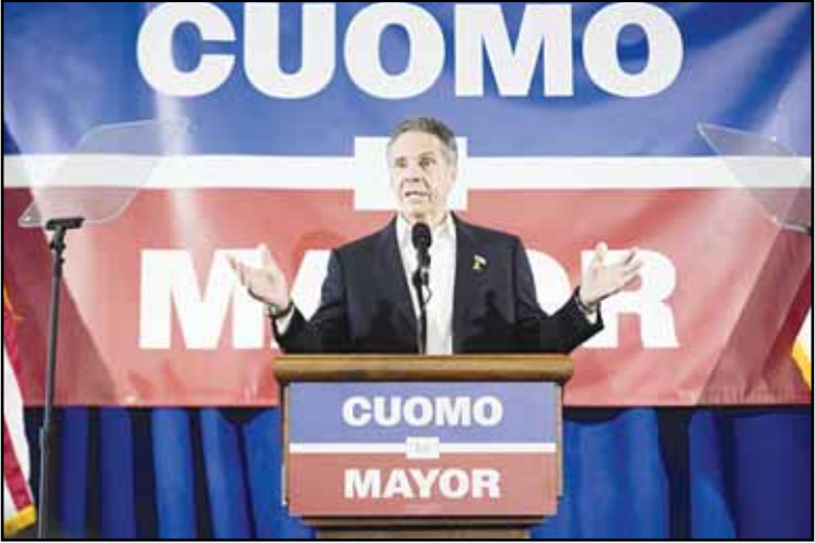
Former New York governor Andrew Cuomo speaks at the New York City District Council of Carpenters while campaigning for mayor of New York City on March 2. (AP)

NEW YORK, July 15, (AP): Former governor Andrew Cuomo launched an independent run for New York City mayor on Monday, restarting his campaign after a bruising loss to progressive Zohran Mamdani in the Democratic primary. In a video, Cuomo announced he would remain in the race to combat Mamdani, a democratic socialist state lawmaker, while previewing a strategic reset that would bring a more personal approach to a campaign that had been criticized as distant from voters. “The fight to save our city isn’t over,” Cuomo said. “Only 13% of New Yorkers voted in the June primary. The general election is in November and I am in it to win it.” Critics of Mamdani’s progressive agenda, which includes higher taxes on the wealthy, have called on donors and voters to unite behind a single candidate for the November election. Instead, Cuomo joins a crowded field that also includes current Mayor Eric Adams, who is also a Democrat running as an independent. These candidates now face a complex task in cobbling together enough voters in an overwhelmingly Democratic city where Mamdani has amassed significant momentum. Former New York governor Andrew Cuomo speaks at the New York City District Council of Carpenters while campaigning for mayor of New York City on March 2. (AP)