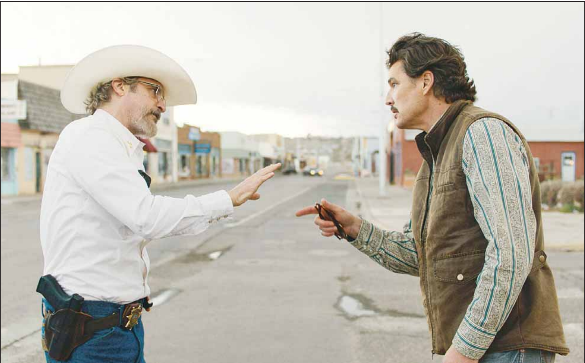
This image released by A24 shows Joaquin Phoenix, (left), and Pedro Pascal in a scene from 'Eddington.'

Joaquin Phoenix stars in a puzzle of paranoia, madness