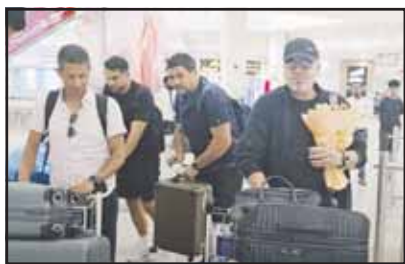
New Al-Qadsiya coach Nabil Maaloul arrives at the Kuwait International Airport.