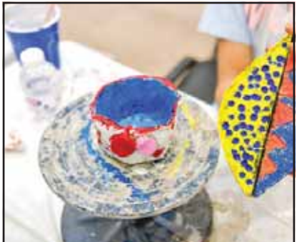
A colored ceramic piece made by a workshop participant.