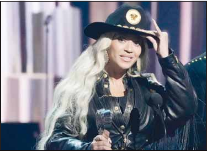
Beyonce, (left), accepts the Innovator Award during the iHeartRadio Music Awards, April 1, 2024, at the Dolby Theatre in Los Angeles.

Beyoncé kicked off her highly-anticipated tour in late April, taking her Grammy-winning album, "Cowboy Carter," to stadiums in the US and Europe. The singer will end her tour with two Las Vegas nights in late July.