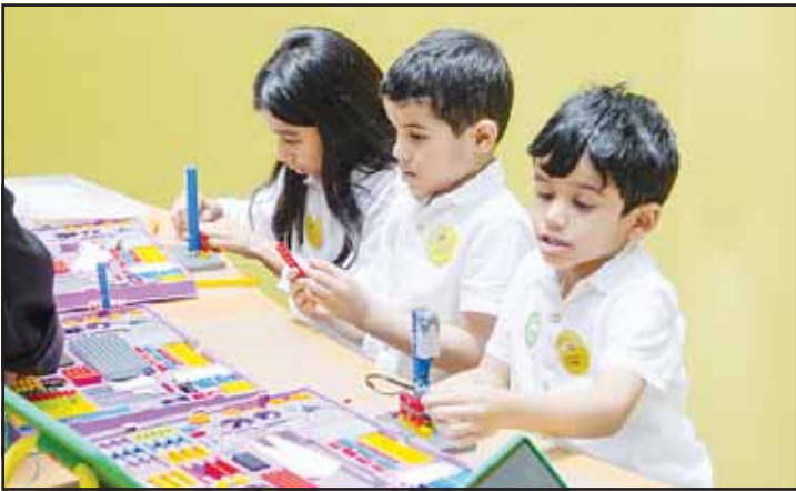
Fun educational experiences on the fundamentals of technology.