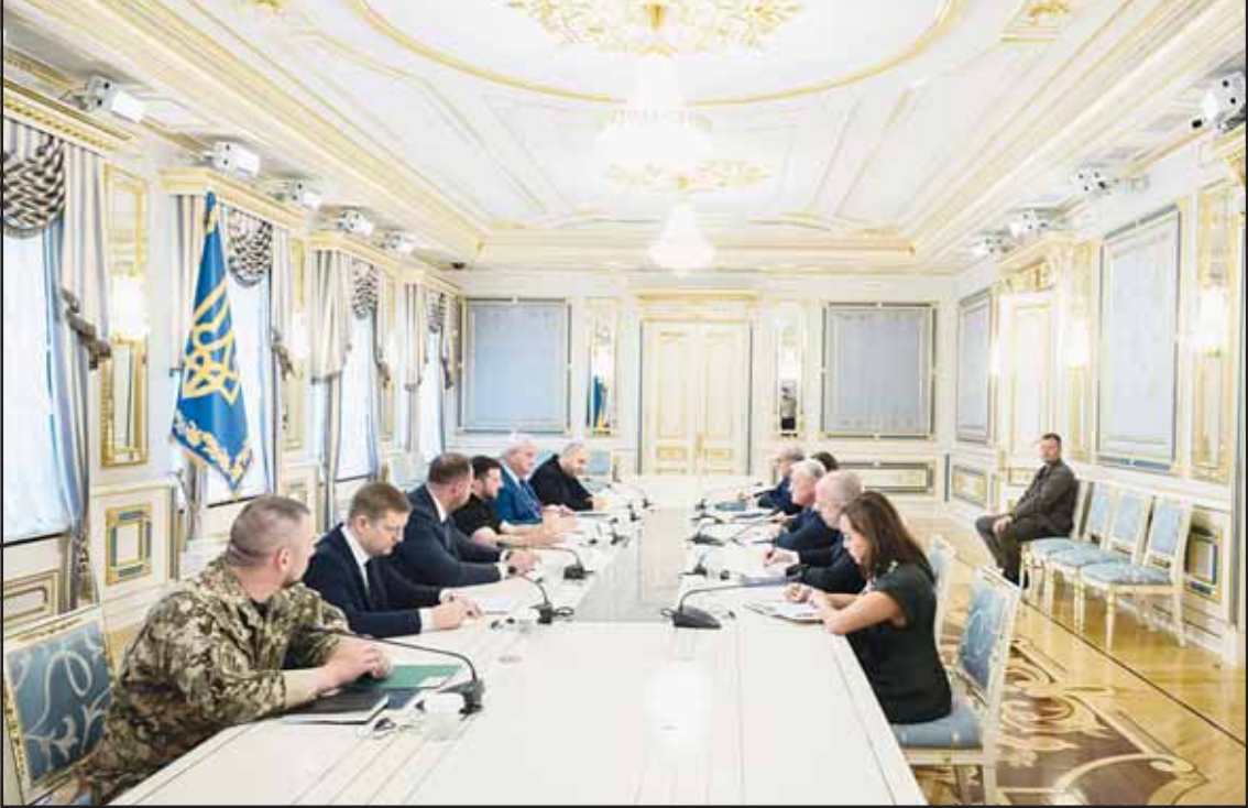
In this photo provided by the Ukrainian Presidential Press Office, Ukrainian President Volodymyr Zelenskyy, (center left), and United States Special Envoy for Ukraine and Russia, Joseph Keith Kellogg, (center right), speak during a meeting, in Kyiv, Ukraine on July 14.