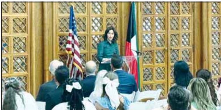
Kuwait Ambassador to the US Sheikh Al-Zain delivers remarks during the KAF's youth awards ceremony.

This step is part of the United Kingdom's plan to fully transition to a digital immigration system.