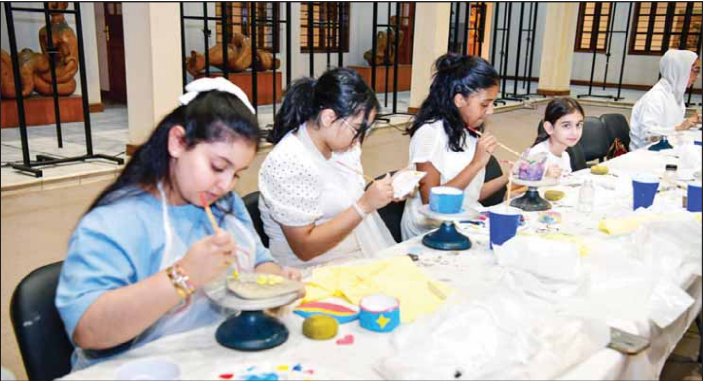
Children participating in the workshop.

with her daughter's involvement in the workshop.