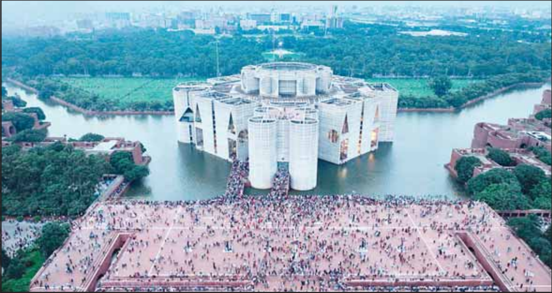
Protesters celebrate at the Parliament House premise after news of Prime Minister Sheikh Hasina’s resignation, in Dhaka, Bangladesh, on Aug 5, 2024.