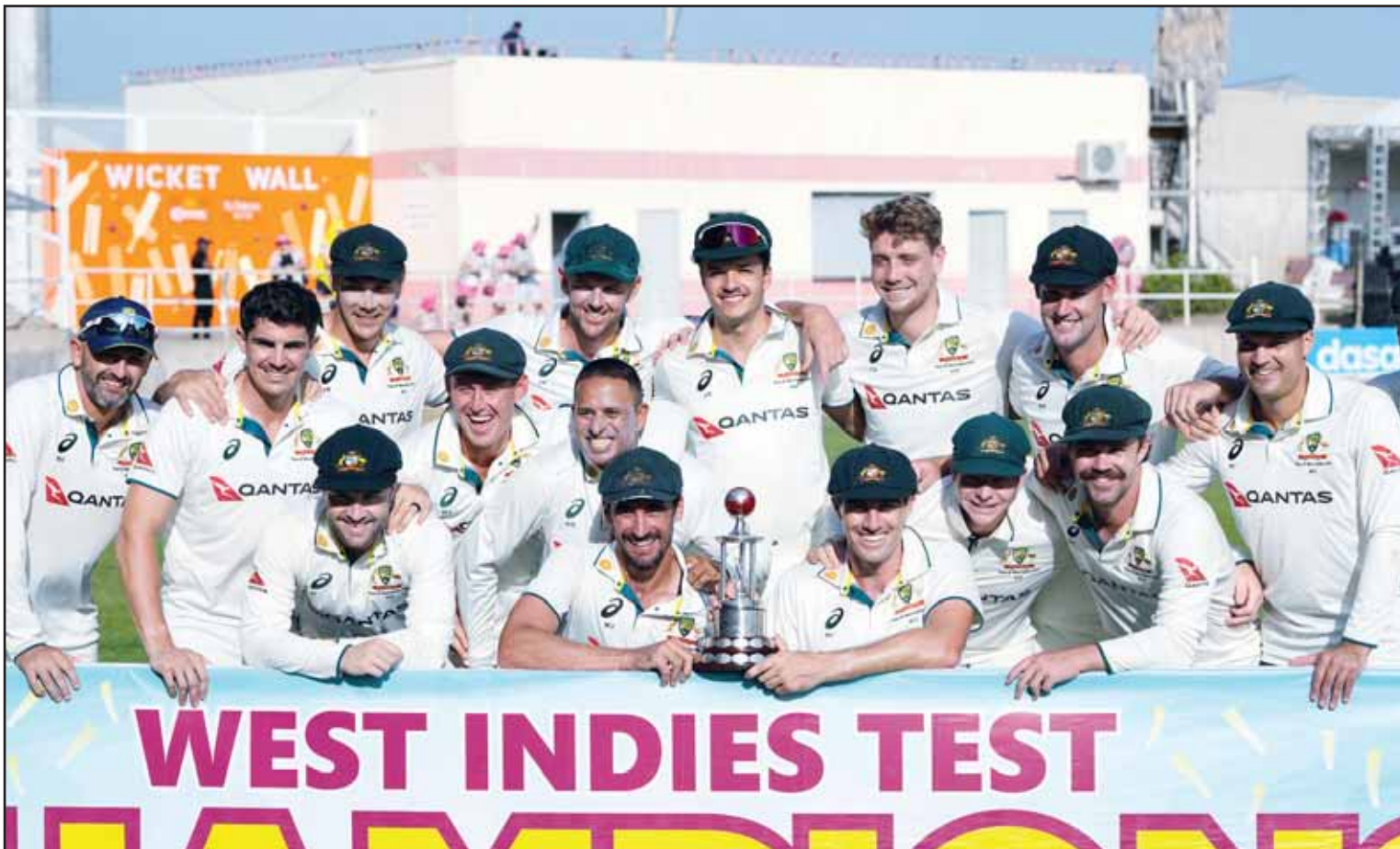
Australia players pose with the trophy after day three of their third Test cricket match against West Indies at Sabina Park in Kingston, Jamaica.