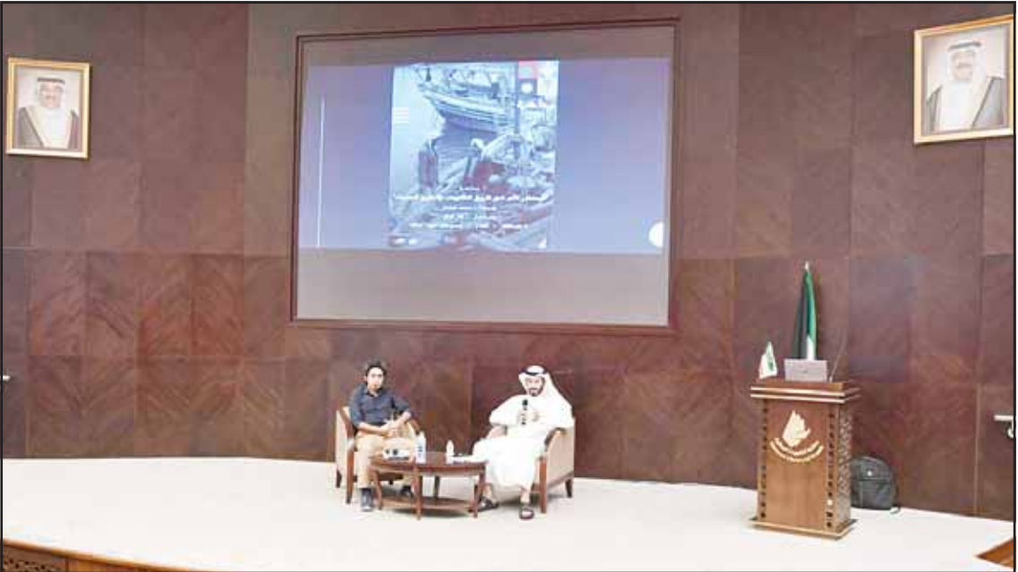
Lecture on 'Primary Sources in the History of Kuwait and the Modern Gulf'.

gan last Wednesday and will run for seven weeks, featuring a diverse array of cultural and artistic events.