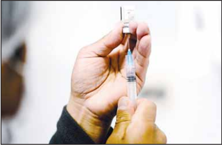
A healthcare worker prepares a shot of the Pfizer COVID-19 vaccine in La Paz, Bolivia, Jan. 7, 2025.