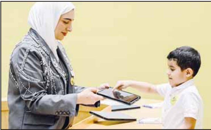
Zain continues its efforts to digitally empower the next generation.

Another milestone reinforcing company's role as a key enabler of Kuwait's digital future