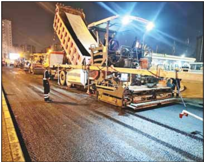
Road repair teams on 5th Ring Road near the ‘Jawazat Roundabout’.

In a related development, Deputy Engineer supervising Contract No. 11 in the Capital Governorate Abdullah Bu Hamad revealed that the ministry teams are present on the Fifth Ring Road, near the Passports Roundabout towards Jahra, to follow up the latest developments in the radical road maintenance work. Bu Hamad said the work being done on the site includes laying Type 3 asphalt, which is included in the road rehabilitation stages in line with the safety and technical quality requirements.