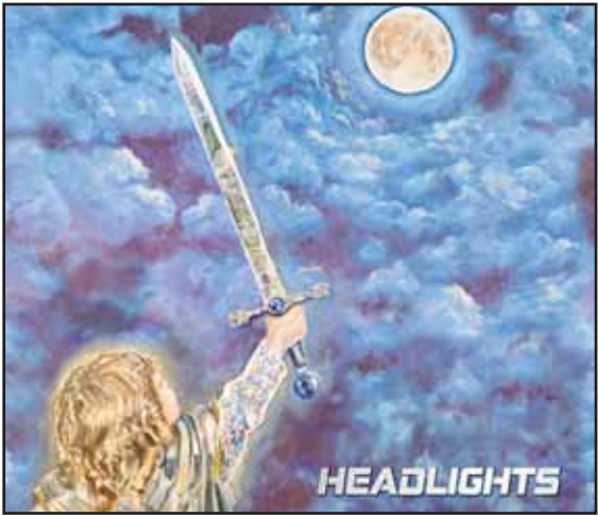
This album cover image released by RCA shows ‘Headlights’ by Alex G.

his “... Save the Animals” sonic pivot to higher fidelity - perhaps to be expected on an album coming from a major label like RCA Records - recording in studios in lieu of his home for a more ornate sound. Think dreamy synths and reverb-soaked riffs. Subdued lyrics and a distorted guitar solo almost turn “Louisiana” into a shoegaze track. “Louisiana / Wild and Free / The only one who wanted me,” he repeats with distorted vocals. If there is a central message to “Headlights,” it appears on the song “Bounce Boy.” “I’m up in the clouds and I pray,” he sings with pitched-up vocals, one of his signature effects. “Say goodbye / To the life / That you knew for so long.” For better or for worse, there is no turning back.