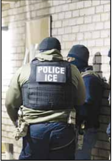
US Immigration and Customs Enforcement officers wait to detain a person on Jan. 27 in Silver Spring, Md.