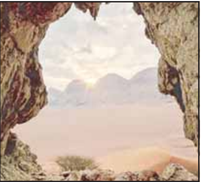
Sharjah's Faya heritage site.

KUWAIT CITY, July 12, (KUNA): Kuwait's National Council for Culture, Arts and Letters (NCCAL) congratulated on Friday the UAE, its government and people on adding Sharjah's Faya to the UNESCO World Heritage List for 2025. In a statement to KUNA, the NCCAL conveyed the congratulations of Minister of Information and Culture, Minister of State for Youth Affairs and NCCAL President Abdulrahman Al-Mutairi on this move, expressing pride for the UAE's position in preserving heritage. This cultural accomplishment shows great continued efforts made by the UAE in preserving humanitarian heritage and historic identity in the region, it stated. The move is an addition to Gulf and Arab efforts aiming to boost heritage presence in international arenas, it noted. The council wished the UAE everlasting