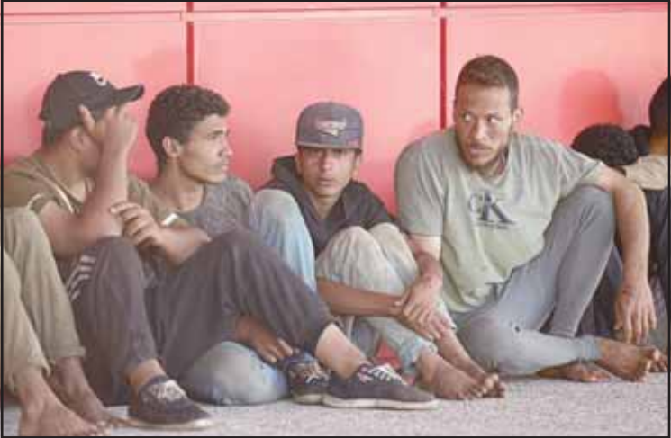
Migrants rescued south of Crete wait to be registered on their arrival at the port of Lavrio, Greece, on July 10.

The emergency measures drew sharp criticism from international human rights organizations. The United