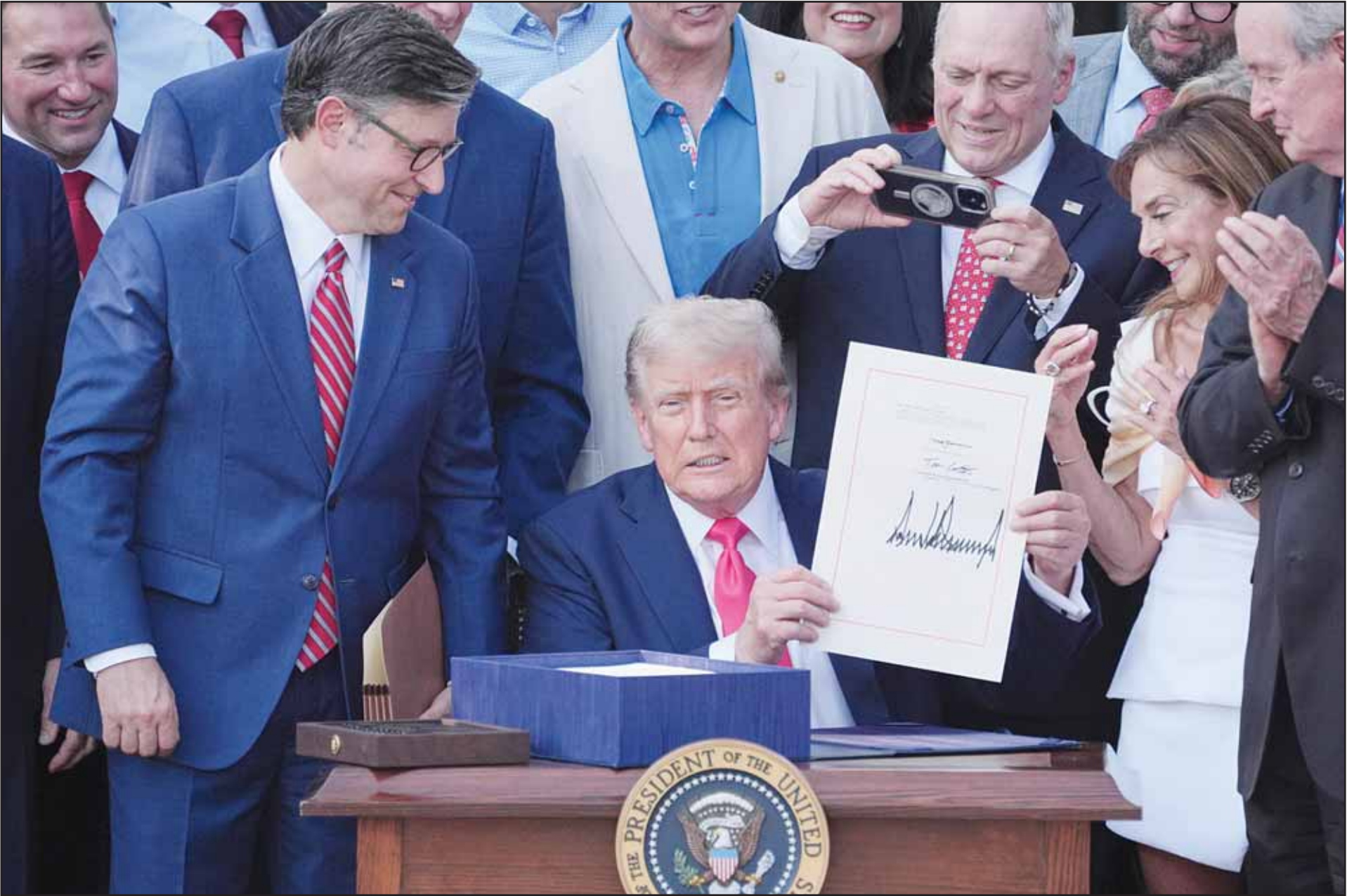
US President Donald Trump holds his signed signature bill of tax breaks and spending cuts at the White House, Friday, July 4, 2025, in Washington, as House Speaker Mike Johnson, left, watches and Rep. Steve Scalise, takes a photo.

The Conversation is an independent and nonprofit source of news, analysis and commentary from academic experts.