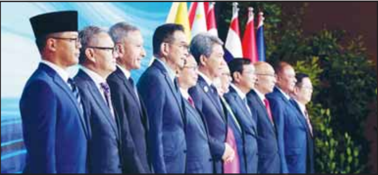
ASEAN foreign ministers during their annual meeting in Kuala Lumpur.

It condemned all attacks against civilians and civilian infrastructure, as well as the continued restrictions on the delivery of humanitarian aid, relief supplies, and basic needs.