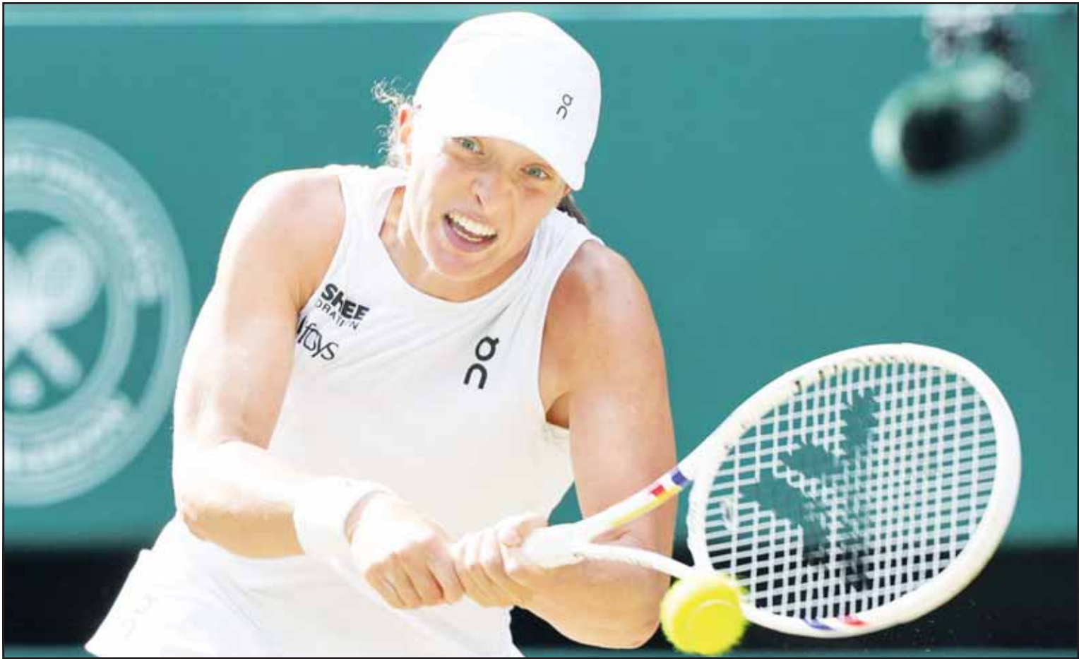
Poland's Iga Swiatek returns to Amanda Anisimova of the U.S. during the women's singles final at the Wimbledon Tennis Championships in London.