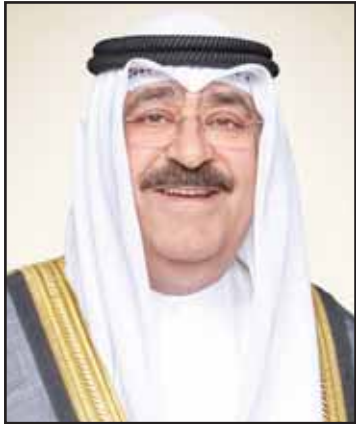
His Highness the Amir Sheikh Meshal Al-Ahmad Al-Jaber Al-Sabah

He explained that the visit would open new horizons for political, economic, and investment cooperation