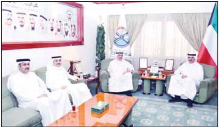
Ahmadi Governorate photo Ahmadi Governor Sheikh Hamoud Jaber Al-Ahmad Al-Sabah with the council members.