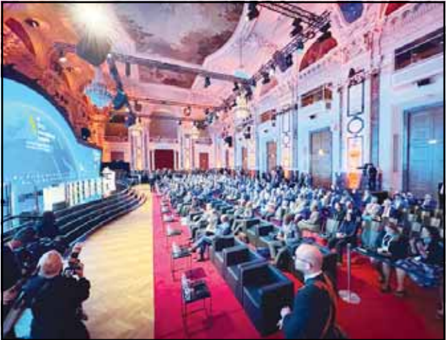
Part of the attendees at the closing session of the Ninth OPEC International Symposium.

VIENNA, July 12, (KUNA): OPEC concluded on Thursday its ninth international seminar after high-level discussions over two days that brought together decision-makers and high-level experts of energy in the world.