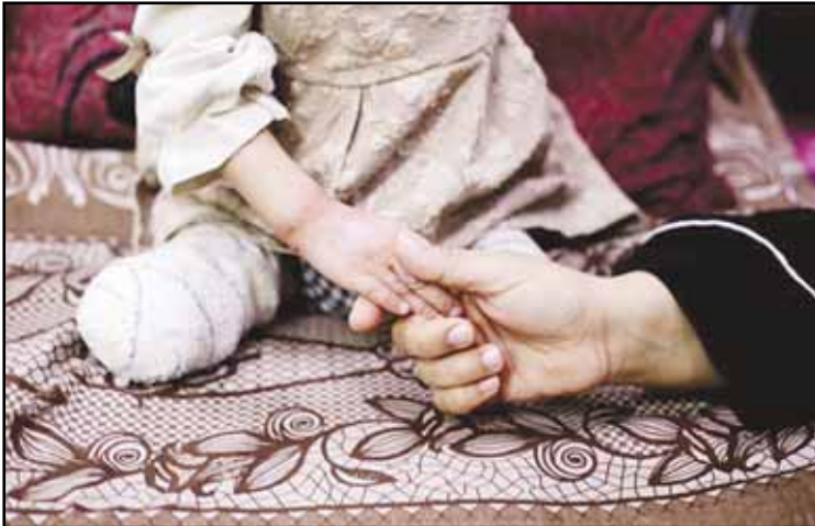
A Palestinian child amputee is seen at Al-Aqsa Martyrs Hospital in the city of Deir al-Balah, central Gaza Strip, on Oct. 5, 2024.