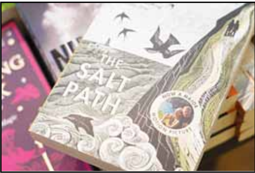
A copy of ‘The Salt Path’, by Raynor Winn is on display in a book store, in London, Friday, July 11.

book clubs, spawned two sequels and the film adaptation, which was released this spring, to generally positive reviews. On its website, publisher Penguin described the book as “an unflinchingly honest, inspiring and life-affirming true story of coming to terms with grief and the healing power of the natural world. Ultimately, it is a portrayal of home, and how it can be lost, rebuilt, and rediscovered in the most unexpected ways.” That statement was released before the controversy that erupted last Sunday. In a wide-ranging investigation, The Observer said that it found a series of fabrications in Raynor Winn’s tale. It said the couple’s legal names are Sally and Timothy Walker, and that Winn misrepresented the events that led to the couple losing their home. The newspaper said that the couple lost their home following accusations that Winn had stolen tens of thousands of pounds from her employer. It also said that