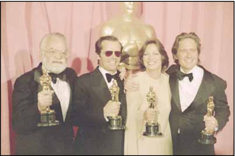
Members of the cast and crew of ‘One Flew Over the Cuckoo’s Nest,’ winners of the Oscars for best actor, best actress and best picture, (from left), co-producer Saul Zaentz, actor Jack Nicholson, actress Louise Fletcher and co-producer Michael Douglas, are shown at the Oscars on March 30, 1976.

Lloyd. DeVito was actually the first person officially cast. Douglas, who’d known him for nearly 10 years, brought Forman to see him play Martini on stage. “Miloš said, ‘Yes! Danny! Perfect! Cast!’ Douglas said in his best Czech accent. “It was a big moment for Danny. But I always knew how talented he was.” Though the film’s themes are challenging, unlike many of its New Hollywood contemporaries it wasn’t a tortured shoot by any stretch. They had their annoyances (like Forman refusing to show the cast dailies) and more serious trials (they found out halfway through production that William Redfield was dying of leukemia), but for the most part it was fun. “We were very serious about the work, because Miloš was very serious. And we had the material, Kesey’s work, and the reverence for that. We were not frivolous about it. But we did have a ball doing it,” DeVito said, laughing. Part of that is because they filmed on