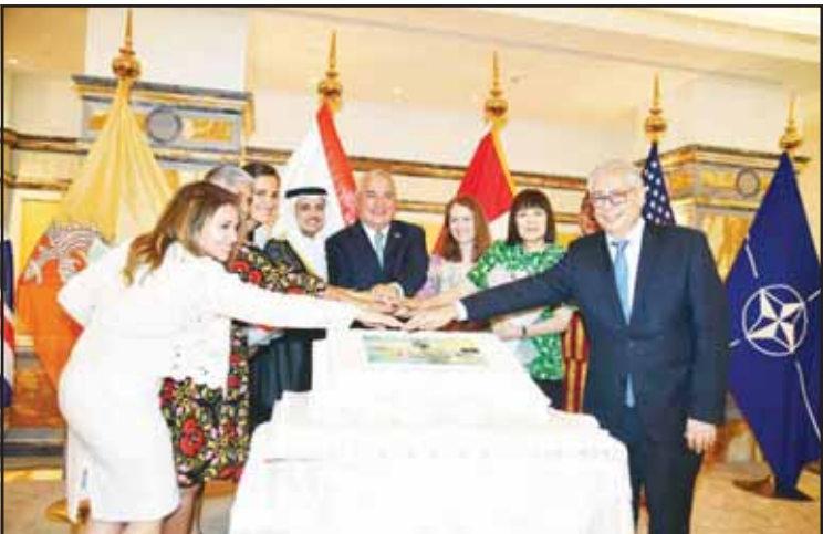
Outgoing envoys at the cake-cutting ceremony.