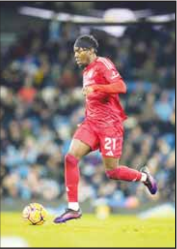
In this file photo, Nottingham Forest's Anthony Elanga controls the ball during the English Premier League soccer match between Manchester City and Nottingham Forest at the Etihad Stadium in Manchester.

Anthony Elanga completed a move from Nottingham Forest to Newcastle for a reported 55 million pounds ($74 million). The Sweden international signed what Newcastle described as a long-term deal. "He is an exciting talent with attributes that make him a unique attacking threat. His pace, energy and ability to create and score goals will strengthen us and complement the way we want to play," Newcastle coach Eddie Howe said. The 23-year-old Elanga began his career at Manchester United but established himself as a leading player in the Premier League at Forest following his 15 million pound ($20 million) move in 2023. He was one of Forest's top performers as it made a surprise push for the Champions League last sea-