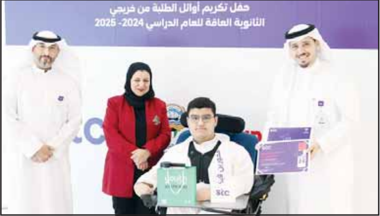
Honoring outstanding students from special needs schools.

their academic goals. This is why our recognition ceremony has become an annual celebration where we can invite high-achieving students and celebrate what they have accomplished