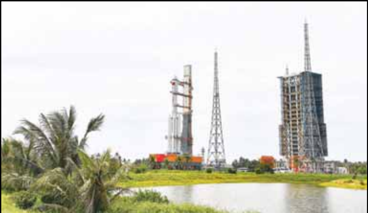
This photo taken on July 12, 2025 shows the combination of the Tianzhou-9 cargo craft, tasked with carrying supplies to China's space station, and a Long March-7 carrier rocket being vertically transferred to the launch site in Wenchang Spacecraft Launch Site in Wenchang, south China's Hainan Province.