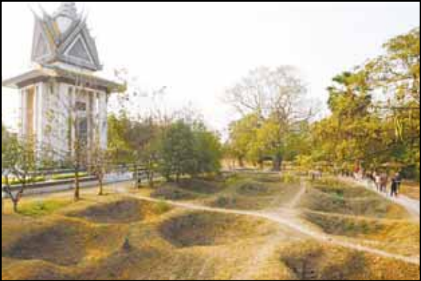
Visitors walk by the mass grave of the victims of the Khmer Rouge regime next to a memorial stupa filled with victims' skulls at the Choeung Ek killing field in Phnom Penh, Cambodia, Wednesday, Feb. 19, 2014.