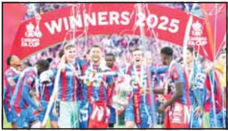
In this file photo, Crystal Palace players celebrate with the trophy after winning the English FA Cup final soccer match between Crystal Palace and Manchester City at Wembley stadium in London. Crystal Palace demoted by UEFA from Europa League because of co-owner Textor's ties to Lyon.