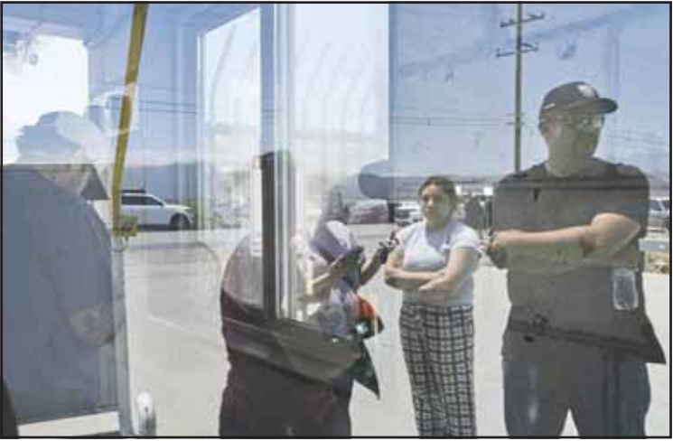
People wait outside of Glass House Farms, a day after an immigration raid on the facility on July 11, in Camarillo, Calif.

Judge Maame E. Frimpong also issued a separate order barring the federal government from restricting attorney access at a Los Angeles im-