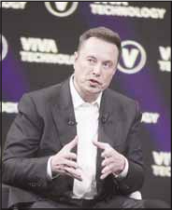
Elon Musk, who owns Twitter, Tesla and SpaceX, speaks at the Vivat-eich fair on June 16, 2023 in Paris.

was acting on information that two people provided in January to its cybercrimes unit. One of them is a