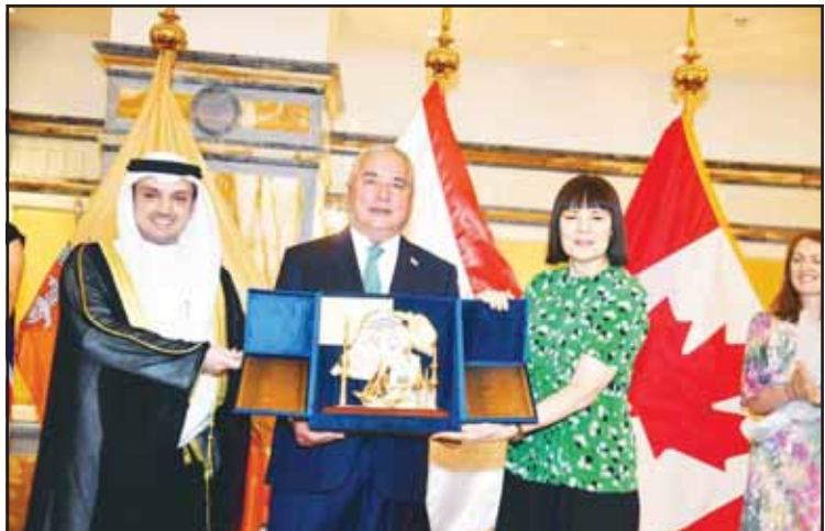
US Ambassador is presented a memento.