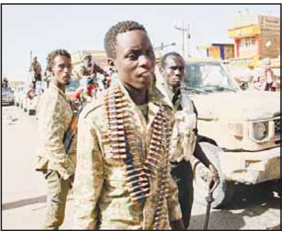
Soldiers arrive to the Allafah market, in an area recently recaptured by Sudan’s army from the Rapid Support Forces paramilitary group, in the Al Kalalah district, south of Khartoum, Sudan on March 27.

CAIRO, July 12, The fight between the Sudanese army and the paramilitary Rapid Support Forces has escalated in Sudan’s central Kordofan region, killing at least four people, healthcare workers said on Friday. Sudan’s paramilitary forces launched artillery shelling on neighborhoods in Obeid city, the capital of North Kordofan province, on Thursday night, killing at least four people and injuring others, Sudan Doctors’ Network said in a statement. The group said the shelling targeted women and elderly people. “The RSF is targeting civilians with guided artillery rockets, deliberately inflicting fatalities in the neighborhoods of El-Obeid, which... are densely populated with displaced people and those who fled from areas under RSF control,” the group said. The fighting in North Kordofan displaced around 700 households between July 4 and July 9, according to the latest update by the International Organization for Migration.