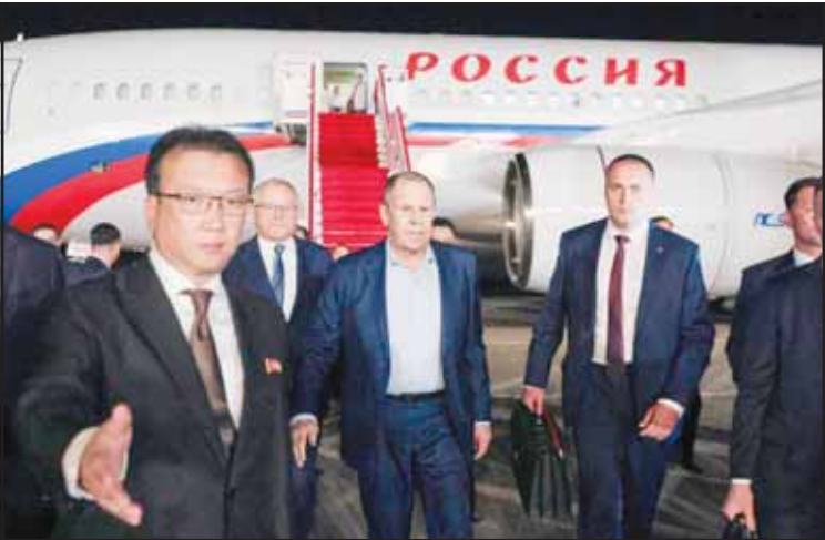
In this photo released by Russian Foreign Ministry Press Service, Russian Foreign Minister Sergey Lavrov, (center), walks from the plane upon his arrival at an international airport outside Pyongyang, North Korea, on July 11. (AP)

ports Russia’s fight against Ukraine. She described ties between North Korea and Russia as “the invincible alliance.” Lavrov said he repeated Russia’s gratitude for the contribution that North Korean troops made in efforts to repel a Ukrainian incursion into Russia’s Kursk border region. Wonsan city, the meeting venue, is where North Korea recently opened a mam-