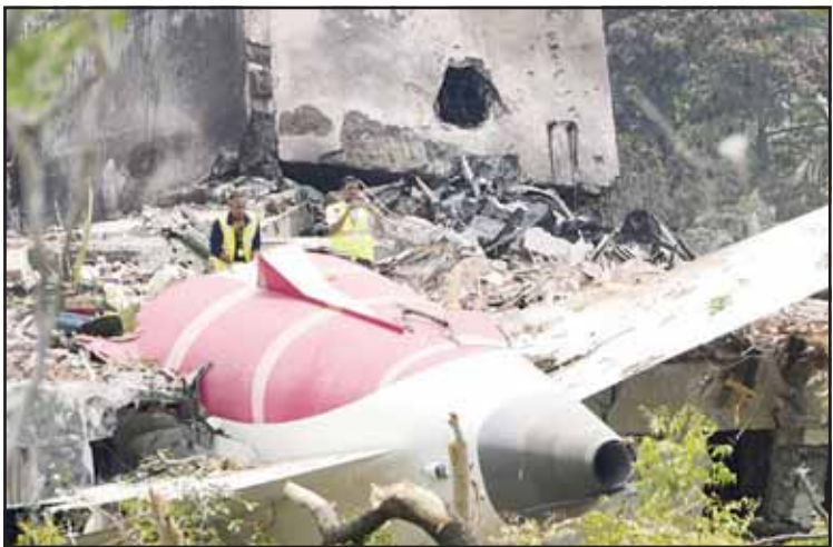
Officials inspect the site of Air India plane crash on the roof of a building in Ahmedabad, India on June 13.

NEW DELHI, July 12, (Agencies): Fuel control switches for the engines of an Air India flight that crashed last month were moved from the “run” to the “cutoff” position moments before impact, starving both engines of fuel, a preliminary investigation report said early Saturday. The report, issued by India’s Aircraft Accident Investigation Bureau, also indicated that both pilots were confused over the change to the switch setting, which caused a loss of engine thrust shortly after takeoff. The Air India flight - a Boeing 787-8 Dreamliner - crashed on June 12 and killed at least 260 people, including 19 on the ground, in the northwestern city of Ahmedabad. Only one passenger survived the crash, which is one of India’s worst aviation disasters. The plane was carrying 230 passengers - 169 Indians, 53 British, seven Portuguese and a Canadian - along with 12 crew members. According to the report, the flight lasted around 30 seconds between takeoff and crash. It said that once the aircraft achieved its top recorded speed, “the Engine 1 and Engine 2 fuel cutoff switches transitioned from RUN to CUTOFF position one after another” within a second. The report did not say how the switches could have flipped to the cutoff position during the flight. The movement of the fuel control switches allow and cut fuel flow to the plane’s engines. The switches were flipped back into