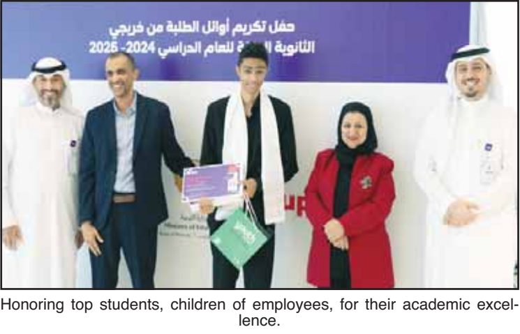
Honoring top students, children of employees, for their academic excellence.

believe in the importance of empowering the younger generation by celebrating their achievements and acknowledging the hard work and effort that they have put in to achieve