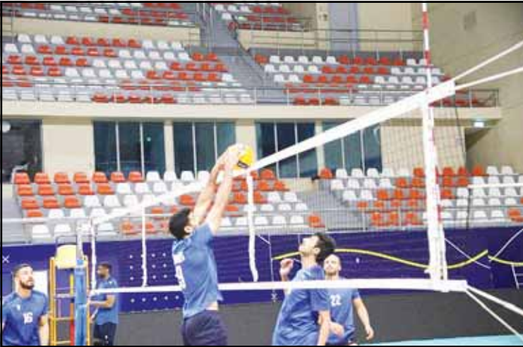
The national volleyball team intensifies its training session.

By Hassan Mosa Al-Seyassah/Arab Times Staff