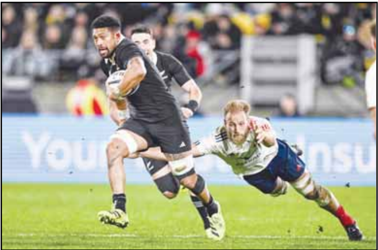
New Zealand's Ardie Savea breaks a tackle as he makes a run during the second rugby union international between the All Blacks and France in Wellington, New Zealand. (AP)

WELLINGTON, New Zealand, July 12, (AP): Ardie Savea scored a try and led the All Blacks superbly to a 43-17 win over France in the second test and an unassailable 2-0 lead in the three-test series. Savea took over the captaincy from the injured Scott Barrett, and under his leadership, the All Blacks produced a more intense and physical performance than in the first test, in which they scraped home 31-27. The All Blacks dominated through their forwards against a French team that had 10 changes to its starting lineup from the first test and still lacked most of its Six Nations stars. "This week we talked about our defense, and we wanted to bring fire in that area, and we did that in most parts of the game," Savea said. "I'm proud of our boys for just sticking with it and doing a good job tonight." With greater control of possession, New Zealand was able to set a higher tempo than in the first test and play more often in the French half. With quick ball and an ability to dominate the collision area and offload in tackles, New Zealand scored six tries on two. Four of those tries came in the first half and only two in the second, in which the All Blacks were less clinical. The All Blacks were dangerous around the fringes of breakdowns through Savea and Cam Roigard and unstoppable when they got the ball wide to fullback Will Jordan and winger Rieko Ioane, who scored tries. The credit belonged mostly to the forwards, who fully atoned for a submissive first test performance.