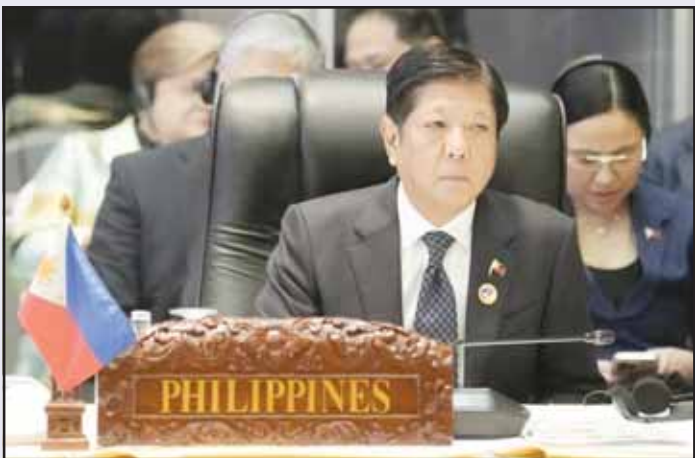
Philippine President Ferdinand Marcos Jr listens during the 12th Association of Southeast Asian Nations (ASEAN) -US Summit in Vientiane, Laos on Oct 11, 2024.