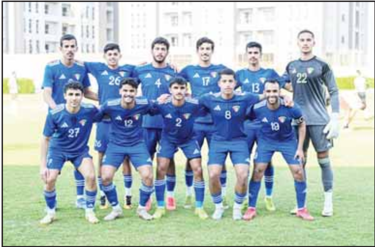
Kuwait U-23 team pose for a group photo before facing Malia Kafr El-Zayat.