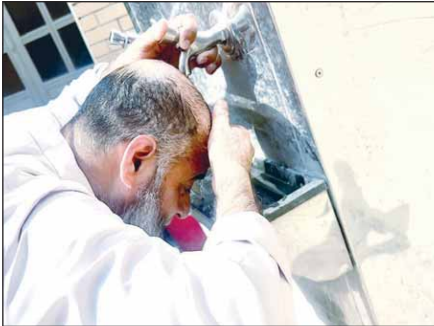
As the blazing Kuwait sun bears down mercilessly, a man lets water cascade over his face – his only refuge from the sweltering heat of the day.