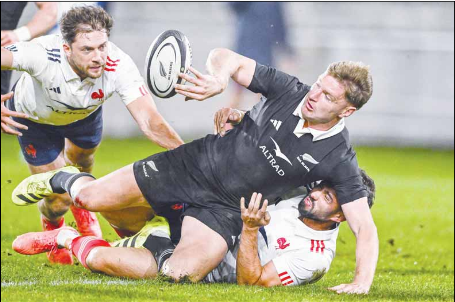
New Zealand's Jordie Barrett passes the ball during the second rugby union international between the All Blacks and France in Wellington, New Zealand.

Wales finally tastes victory after 19 tests and 644 days