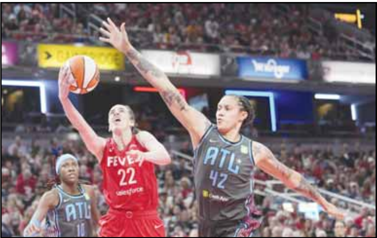
Indiana Fever's Caitlin Clark (22) shoots against Atlanta Dream's Brittney Griner (42) during the second half of a WNBA basketball game in Indianapolis.

SEATTLE, July 12, Gabby Williams scored 18 points, including a 3-pointer with 6:10 remaining to put the Seattle Storm up for good in a 79-65 win against the Connecticut Sun. Williams' shot gave the Storm (13-8) a 63-62 lead and started a 19-3 game-ending run. The Storm outscored the Sun 24-13 in the fourth quarter. Nneka Ogwumike chipped in 16 points while Skylar Diggins and Ezi Magbegor each added 14 points for Seattle. Tina Charles led Connecticut (3-17) with 20 points. Saniya Rivers had 12 points while Olivia Nelson-Ododa and Leila Lacan scored 10 each. The strong finish was needed, considering the Storm got off to a slow start. Seattle trailed 16-10 after the first quarter thanks to sloppy shooting. The Storm converted just 23.5% of their shots in the opening frame while Connecticut forward Charles scored eight of her 20 points in the quarter. The Storm chipped away at their deficit and even took a 29-28 lead at the 1:57 mark in the second quarter on a 14-foot jump shot from Erica Wheeler. The teams traded the lead for much of the second and third quarters before Seattle pulled away in the fourth. The Sun continues with its quick road trip on Sunday against the Los Angeles Sparks. The Storm, meanwhile, will continue its homestand on Sunday when it hosts the Washington Mystics. Kelsey Mitchell scored 25 points, Aliyah Boston had 19 points, six re