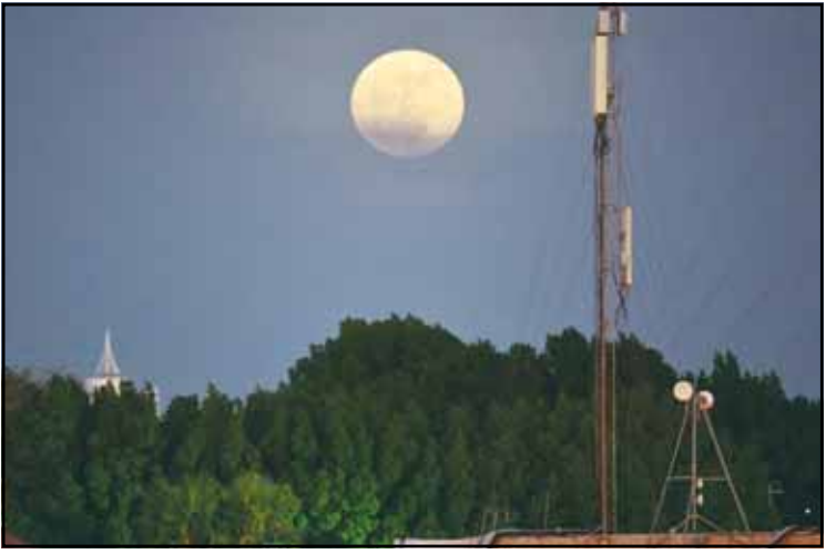
The Gazelle Moon – a rare phenomenon in the Gulf.

KUWAIT CITY, July 12, (KUNA): The skies of Kuwait showcased the extraordinary Gazelle Moon, a breathtaking celestial phenomenon eagerly anticipated by astronomy enthusiasts and observers around the world on Thursday. This enchanting event captured the attention and admiration of many, highlighting its significance in the realm of astronomical occurrences. The Al-Ajairy Scientific Center reported to the Kuwait News Agency (KUNA) that the Kuwaiti sky showcased the brilliance of the first full moon of the astronomical summer in the northern hemisphere, illuminating the night with a magical and distinctive color. The full moon in July is referred to as the “Gazelle Moon” due to its alignment with the season when new horns begin to develop on the heads of gazelles. This full moon is notable for being one of the lowest full moons of the