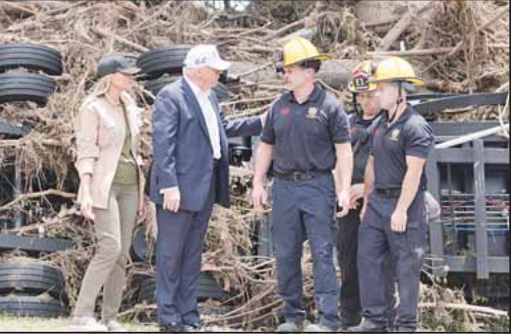
US First Lady Melania Trump, (from left), and President Donald Trump greet first responders as they observe flood damage in Kerrville, Texas on July 11.

“All across the country Americans’ hearts are shattered,” he said. “I had to be