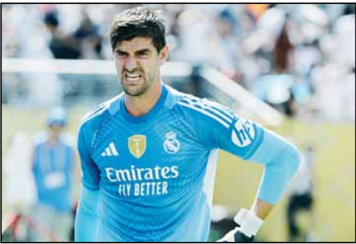
Real Madrid’s Thibaut Courtois reacts after a crash during the Club World Cup semifinal soccer match between PSG and Real Madrid in East Rutherford, N.J.

“I believe that they will have 20 days to rest instead of 21 and no other leagues like the Premier League for Chelsea or the French Ligue 1 for PSG are changing the games,” he said through a translator during a Friday interview with