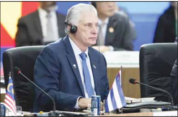
Cuba’s President Miguel Diaz-Canel attends the 17th annual BRICS summit in Rio de Janeiro on July 6.

HAVANA, July 12, The United States government announced Friday it was sanctioning Cuban President Miguel Díaz-Canel and other top officials for human rights violations and restricting access to visas on the anniversary of the biggest protests on the island in recent decades. US Secretary of State Marco Rubio said on social media platform X that the State Department also would impose visa restrictions on Cuban judicial and prison officials “responsible for, or complicit in, the unjust detention and torture of the July 2021 protesters.” The protests, which were not led by an opposition group, developed July 11 and 12, 2021, drawing attention to the depths of Cuba’s economic crisis. “The US will continue to stand for the human rights and fundamental freedoms of the people of Cuba, and make clear no illegitimate, dictatorial regimes are welcome in our hemisphere,” Rubio said in the statement. The Trump administration has taken a harder line against Cuba’s government than the Biden administration. In addition to Díaz-Canel, the U.S. sanctioned Cuban Defense Minister Álvaro López Miera and Interior Min