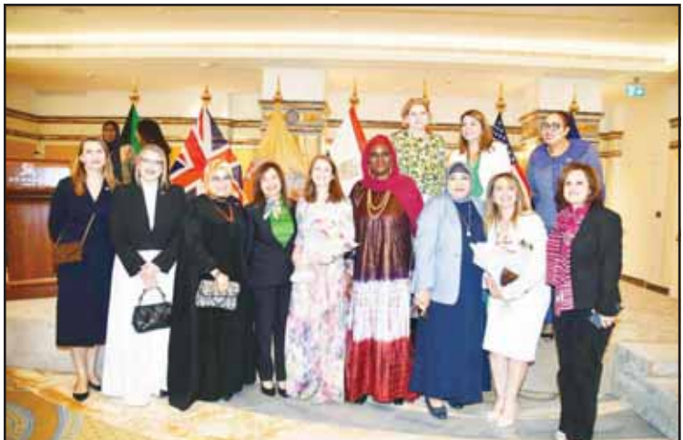
Various ambassadors and diplomats pose for a picture.