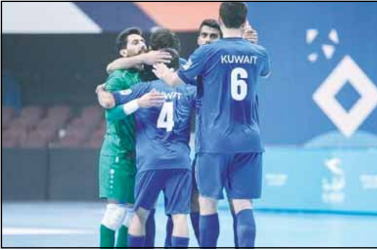
A file photo of players celebrating.

By Hassan Mosa Al-Seyassah/Arab Times Staff