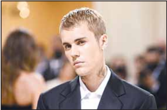
Justin Bieber attends The Metropolitan Museum of Art's Costume Institute benefit gala on Sept. 13, 2021, in New York.

In 2023, Bieber sold the rights to his music - all six of his albums, including hits like "Sorry" and "Baby" - to Hipgnosis, a U.K.-based music investment company. The deal's fi-