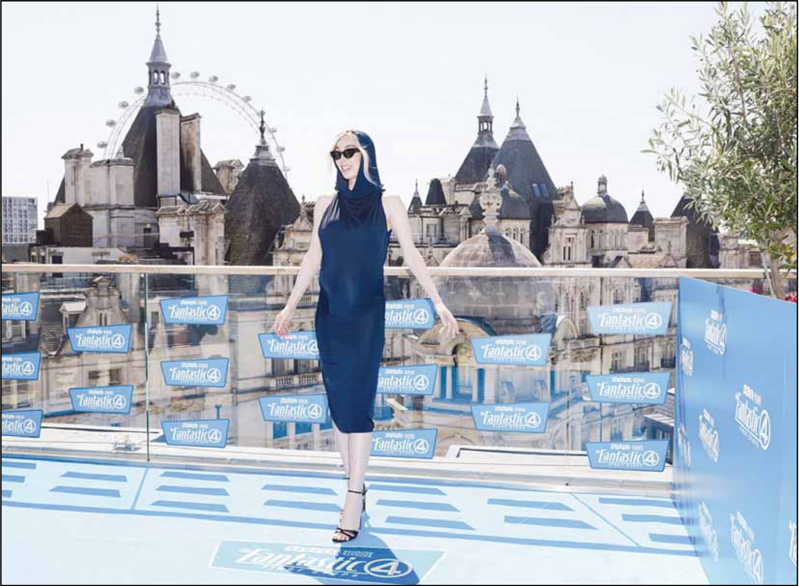
Vanessa Kirby poses for photographers upon arrival at the photo call for the film ‘The Fantastic Four: First Steps’ on Friday, July 11, in London.