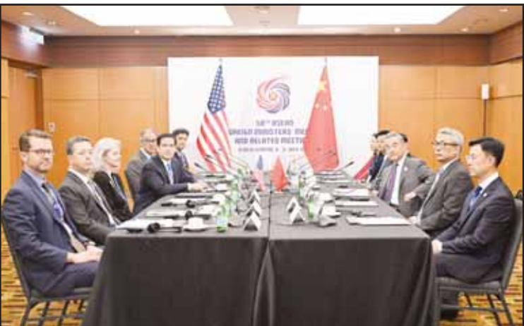
Chinese Foreign Minister Wang Yi, also a member of the Political Bureau of the Communist Party of China Central Committee, meets with US Secretary of State Marco Rubio in Kuala Lumpur, Malaysia on July 11. (Xinhua)

KUALA LUMPUR, July 12, (Xinhua): China and the United States should work together to find the right way to get along with each other in the new era, Chinese Foreign Minister Wang Yi said here on Friday. Wang, also a member of the Political Bureau of the Communist Party of China Central Committee, expressed his hope that the U.S. side would view China with an objective, rational and pragmatic attitude. Wang made the remarks during a meeting with US Secretary of State Marco Rubio in the Malaysian capital on the sidelines of the ASEAN Foreign Ministers’ Meeting and related meetings. Wang comprehensively expounded China’s principled positions on developing China-U.S. relations, emphasizing that both sides should translate the important consensus reached by the two heads of state into specific policies and actions. Noting that the US policy towards China should be based on the goal of peaceful coexistence and win-win cooperation, Wang said the United States should treat China in an equal, respectful and mutually beneficial manner. During the meeting, both sides exchanged views on Sino-US relations and issues of common concern. Also: KUALA LUMPUR: Chinese Foreign Minister Wang Yi on Friday met with