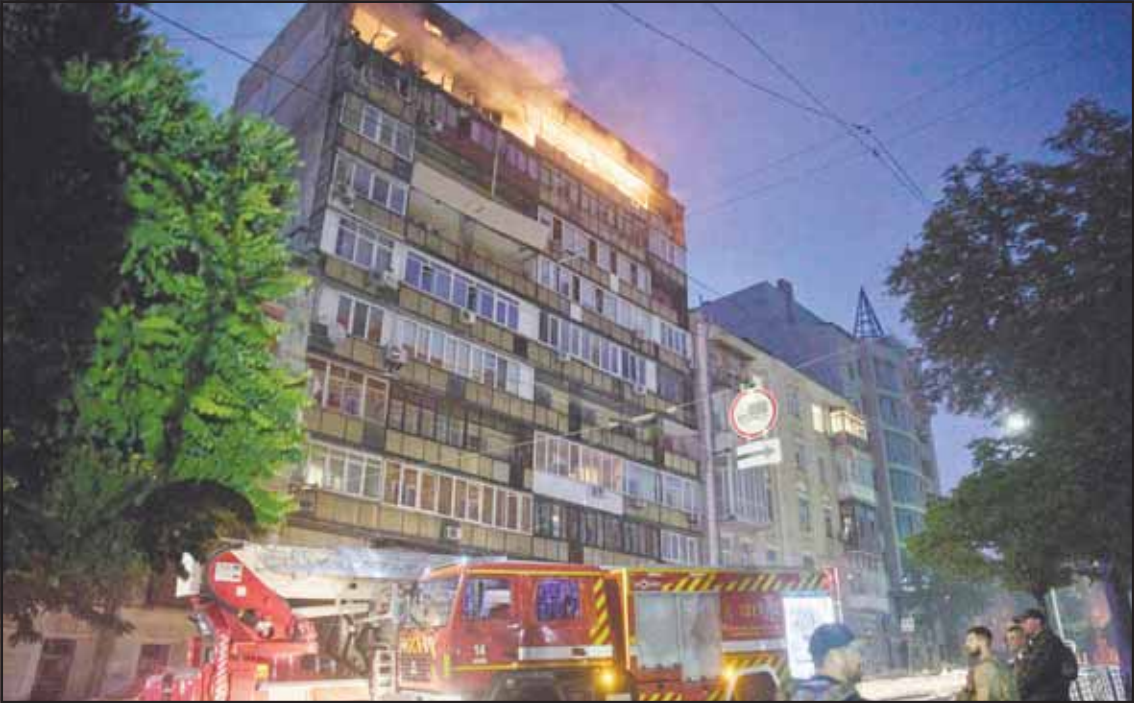
A fire burns at a residential building after a Russian attack in Kyiv, Ukraine on July 10.