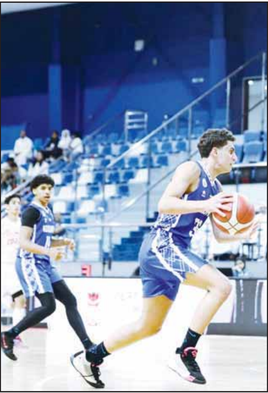
A Kuwaiti dribbles the ball as his teammate looks on.

CAIRO, July 12: The draw for the Arab Junior Basketball Championship placed Kuwait in Group B, alongside Qatar, Lebanon, and Tunisia. Group A features host nation Egypt, along with Bahrain, Jordan, and Algeria. The draw was held yesterday in Cairo, where the tournament will take place from August 10 to 17 at the 6th of October Hall. The competition will be played in a single round-robin format across two groups. In the quarterfinal stage, the top team from Group A will face the fourth from Group B, the second from Group A will play the third from Group B, and the fourth from Group A will meet the top team from Group B. The winners will progress to the semifinals, while the losing teams will compete in placement matches for fifth to eighth place. Meanwhile, Kuwait's junior national team is scheduled to return from Bahrain this evening after concluding its participation in the Gulf Cup qualifiers for the Asian Cup finals, which will be held in Mongolia next month. The team faced Saudi Arabia last night in Manama to wrap up its campaign. In a separate development, the Arab Basketball Federation announced the postponement of the draw for the 36th Arab Men's Championship by 24 hours. This came after the Tunisian Federation withdrew from hosting the tournament on its previously scheduled dates of July 25 to August 2. The competition will now be held in December.