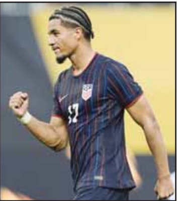
United States forward Malik Leon Tillman celebrates after scoring during a penalty kick shootout of a CONCACAF Gold Cup quarterfinals soccer match against Costa Rica in Minneapolis.

LEVERKUSEN, Germany, July 12, Bayer Leverkusen has moved to replace Florian Wirtz by signing United States international Malik Tillman from PSV Eindhoven for a club-record fee. The 23-year-old attacking midfielder signed a contract through June 2030, the Bundesliga club said Saturday. Kicker magazine reported Leverkusen was paying PSV a fixed sum of 35 million euros ($41 million) for the player, making him the club's most expensive incoming transfer. "We've gained another strong and very dangerous attacking player," Leverkusen sporting director Simon Rolfes said "He can play in both the number 10 and the number 8 positions in midfield. Malik is an absolute top signing for us." Tillman, who was born in Nuremberg, Germany to a German mother and American father, played through Bayern Munich's youth teams after switching from Bavarian rival Greuther Fürth in 2015. He was unable to establish himself in the senior team and made just seven appearances for Bayern before joining Glasgow Rangers on loan in 2022-23. He joined PSV on loan with an option to buy the next season, before PSV activated the buy option last year. Tillman scored 16 goals and set up five more in 34 competitive games for PSV last season, helping it to the Dutch league title. Leverkusen is rebuilding this off-season amid star player Wirtz' departure for Liverpool for a Bundesliga-record fee.