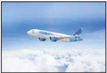
Jazeera unveils holiday sale with 25% discount.

Officer said, "We're pleased to offer a wide range of travel options that are both affordable and convenient, helping bring people closer to the moments that matter most. Whether it's a long overdue holiday, a spontaneous adventure, or a much-awaited visit to family back home, this offer makes it easier for everyone to create meaningful memories—without breaking the budget. The 25% discount reflects Jazeera Airways' ongoing commitment to making travel more accessible, while opening up a world of opportunities for adventure, culture and connection."