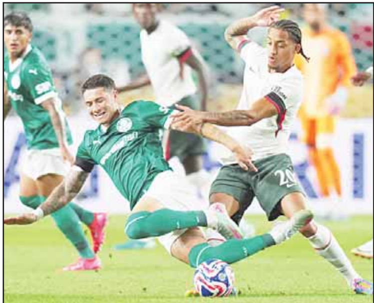
Palmeiras' Emiliano Martinez, left, falls challenged by Chelsea's Joao Pedro during the Club World Cup quarterfinal soccer match between Palmeiras and Chelsea in Philadelphia.

we know how hard we work to give our all on the field,” he said.