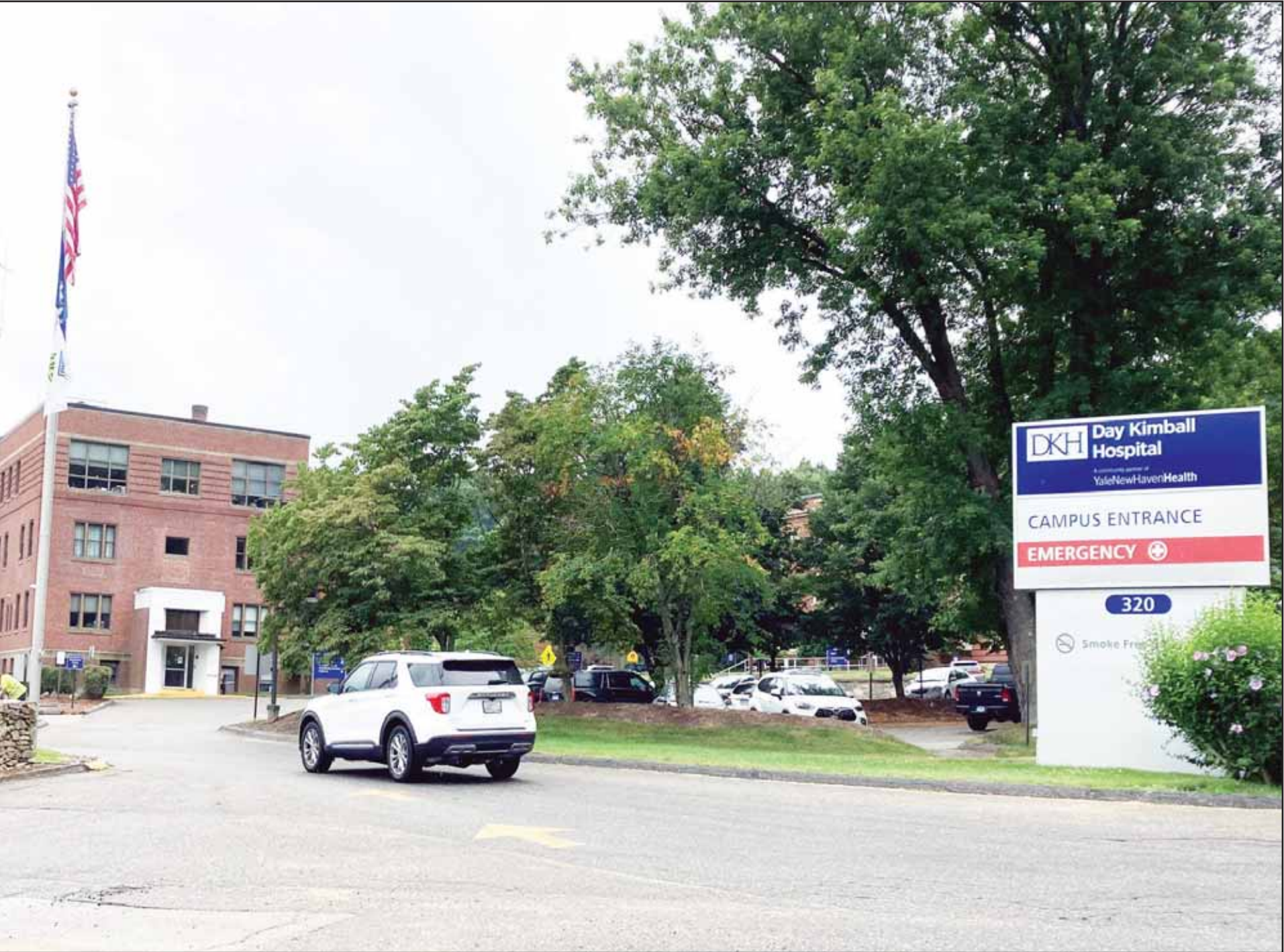
A car enters the drive at Day Kimball Hospital, July 18, 2022 in Putnam, Conn.

Why millions of working Americans will lose health insurance