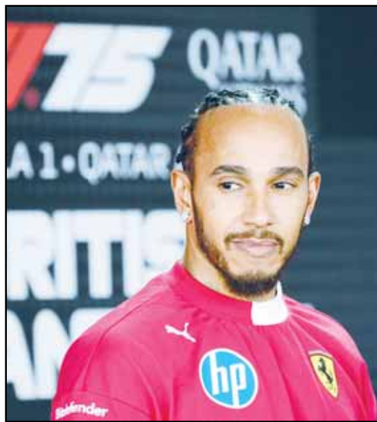
Ferrari driver Lewis Hamilton of Britain talks to the media at the Silverstone racetrack, ahead of the British Formula One Grand Prix, in Silverstone, England, Thursday, July 3.

The grand jury will consider 12 movies for the top prize, the Crystal Globe.