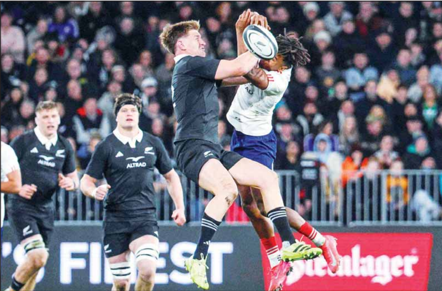
Jordie Barrett of New Zealand and Theo Attissogbe, right, of France compete for the ball during their rugby test against France in Dunedin, New Zealand.

Wales losing streak up to 18 tests after losing to Japan