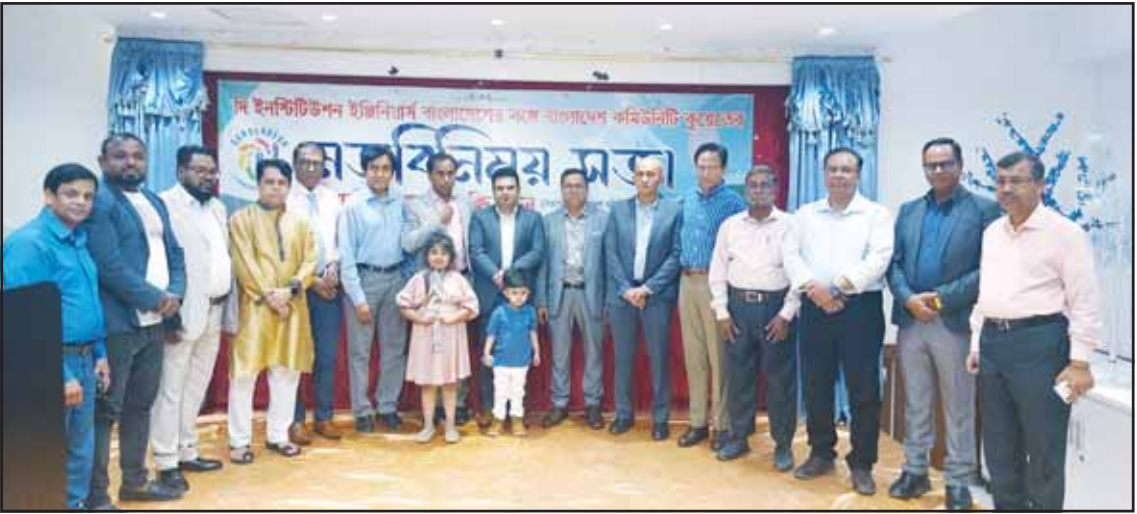
Participants pose for a group photo during the event.