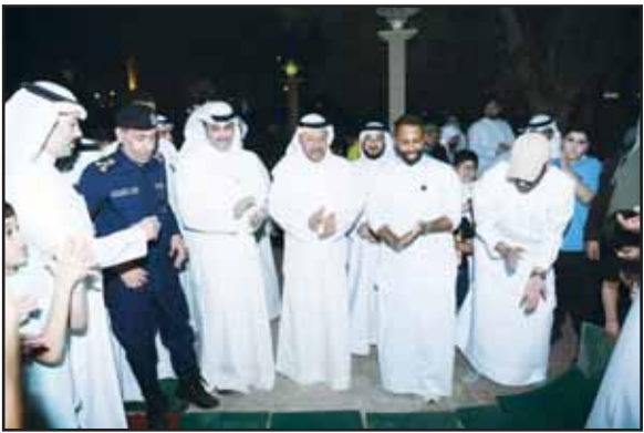
Farwaniya Governor Sheikh Athbi Al-Nasser Al-Athbi Al-Sabah conducted an inspection tour of Al-Firdous public park Wednesday evening as part of ongoing efforts to develop parks and landscaping in the governorate.