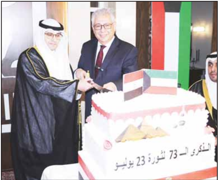
Egyptian Ambassador to Kuwait Osama Shaltout and Minister of State for Municipal Affairs and Minister of State for Housing Affairs Abdullatif Al-Mishari at the cake-cutting ceremony.