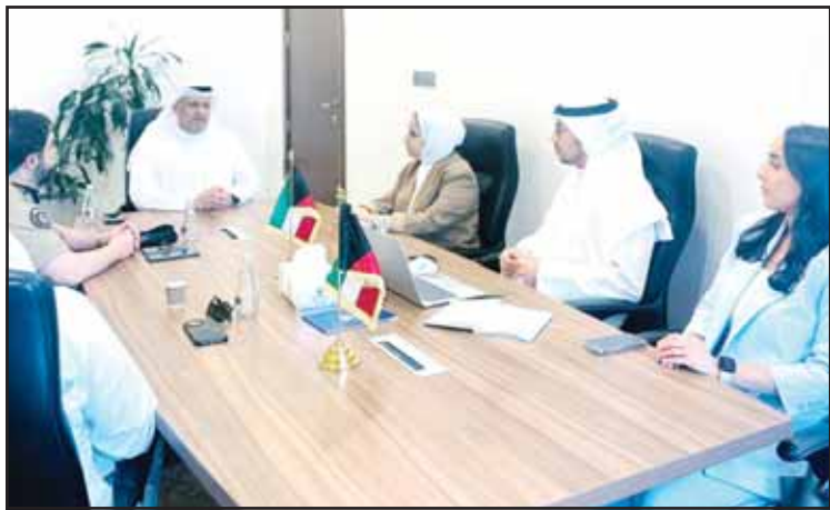
Minister of State for Communication Affairs Omar Al-Omar during a meeting with Sahel's Executive Committee.

GENEVA, July 5, (KUNA): Kuwait's delegation to the United Nations in Geneva called for avoiding politicization and selectivity in providing technical cooperation and capacity-building in the field of human rights, affirming the country's commitment to mutual respect.