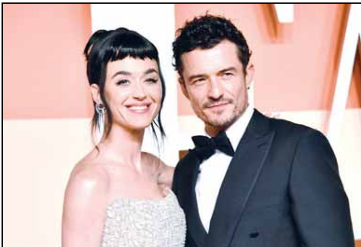
Katy Perry and Orlando Bloom appear at the Vanity Fair Oscar Party in Beverly Hills, Calif., on March 2, 2025.

Bloom, who is from Canterbury, England, is best known for his roles as the elf Legolas in “The Lord of the Rings” and “The Hobbit” films as well as Will Turner in the “Pirates of the Caribbean” series.