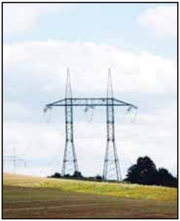
High-voltage power line pylons are seen as Czech Republic faces a major electricity blackout near Benesov, Czech Republic on July 4. (AP)

PRAGUE, July 5, (AP): A temporary power outage hit parts of the Czech Republic's capital and other areas of the country Friday, bringing public transport and trains to a standstill, officials said. Prague's entire subway network was inoperative starting at noon, the capital city's transport authority said, though subway service was restored within half an hour. Prime Minister Petr Fiala said in a post on X that the outage hit other parts of the country and authorities were dealing with the problem. "We are facing an extraordinary and unpleasant situation," Fiala said, adding it was a priority to renew power supplies. The CEPS power grid operator acknowledged problems in parts of four regions in northern and eastern Czech Republic. It said a fallen electricity line in the northwestern