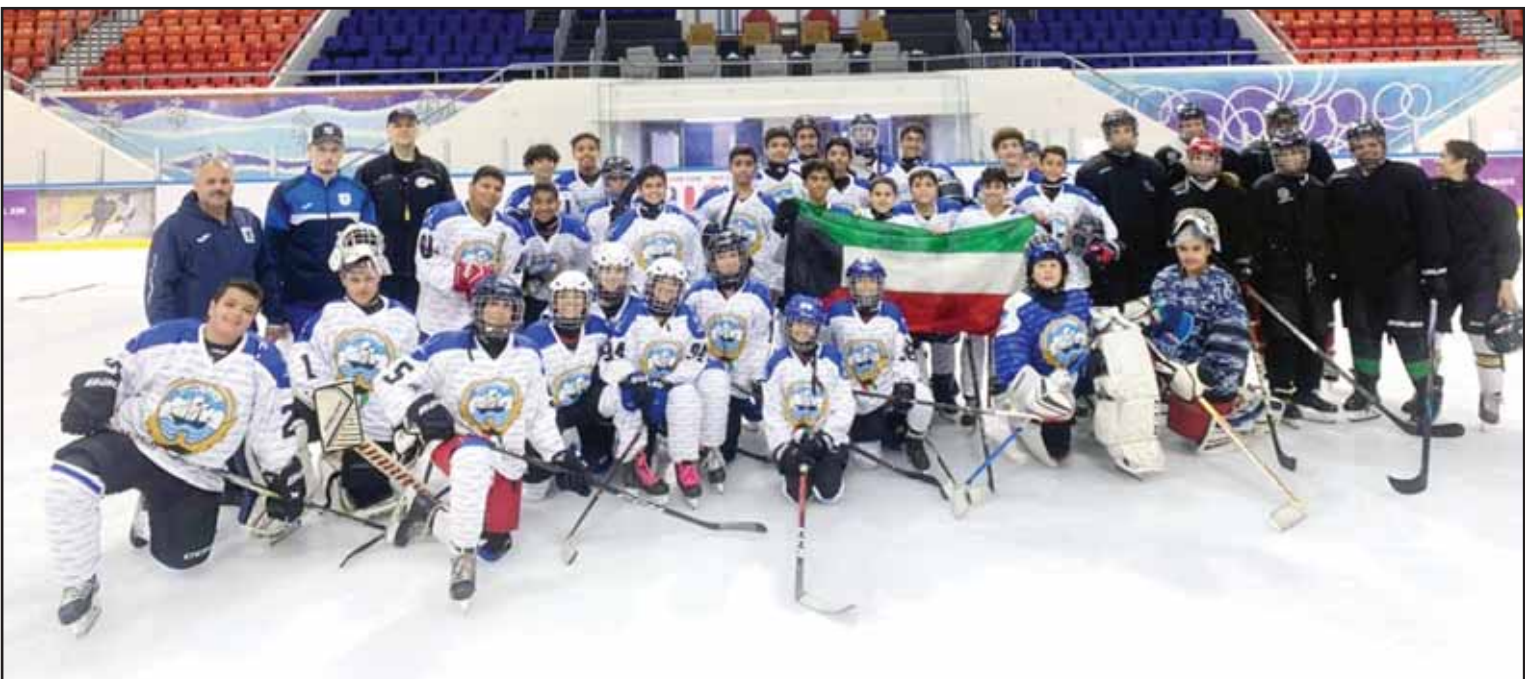
The players pose for a team photo after wrapping up training camp in Al Ain.

He also commended the players’ dedication and enthusiasm throughout the camp, highlighting their discipline and commitment in both training and matches. Al-Ajmi reaffirmed the club’s ongoing support for youth development in ice hockey, stressing that nurturing young talent is essential to the future success of the sport in Kuwait.