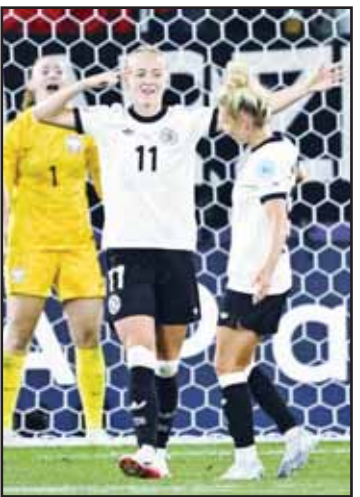
Germany's Lea Schueller celebrates after scoring her side's second goal during the Euro 2025, group C, soccer match between Germany and Poland at Arena St. Gallen in St. Gallen, Switzerland.

The midfielder exchanged passes with captain Kosovare Asllani - making her 200th appearance for Sweden - before striding on to shoot low past