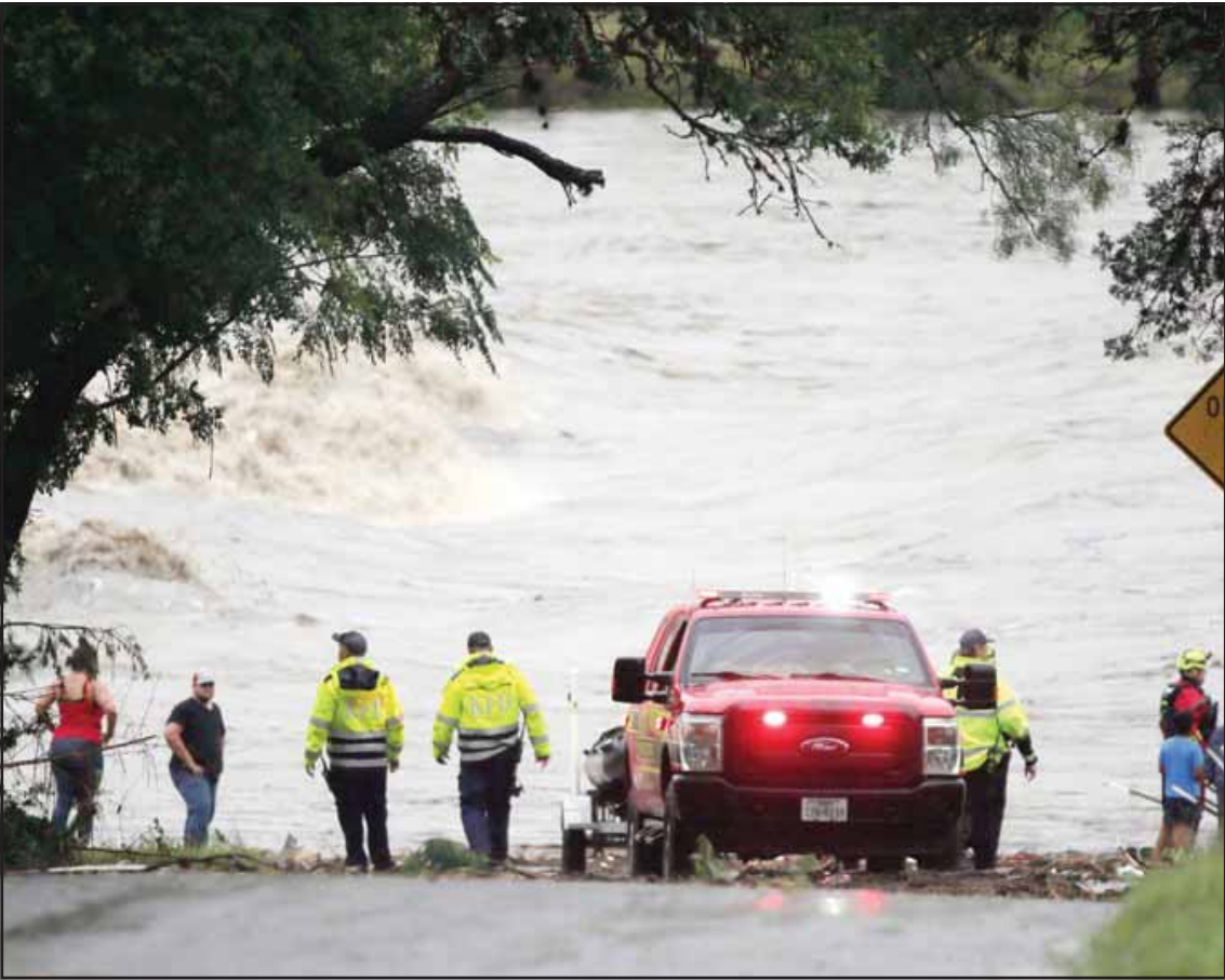
First responders scan the banks of the Guadalupe River for individuals swept away by flooding in Ingram, Texas on July 4.