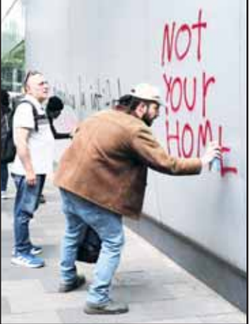
A demonstrator sprays graffiti during a protest against gentrification, as the increase in remote workers has risen prices and increased housing demand in neighborhoods like Condesa and Roma, in Mexico City on July 4. (AP)

MEXICO CITY, July 5, (AP): A protest by hundreds against gentrification and mass tourism that began peacefully Friday in Mexico City neighborhoods popular with tourists turned violent when a small number of people began smashing storefronts and harassing foreigners. Masked protesters smashed through the windows and looted high-end businesses in the touristic areas of Condesa and Roma, and screamed at tourists in the area. Graffiti on glass shattered glass being smashed through with rocks read: "get out of Mexico." Protesters held signs reading "gringos, stop stealing our home" and demanding local legislation to better regulate tourism levels and stricter housing laws. Marchers then continued on to protest outside the US Embassy and chanted inside the city's metro system. Police reinforcements gathered outside the Embassy building as police sirens rung out in the city center Friday eve-