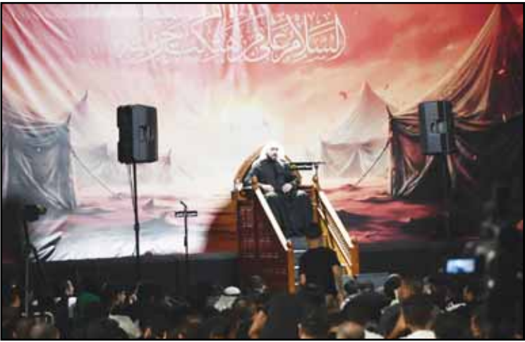
The sermons on the ninth night of Muharram, highlight love, tolerance, and the Prophet's family as a beacon of harmony.

message. In the sermons on the ninth night of Muharram, the preachers emphasized that the Husseiniyas councils are platforms for guidance and goodness; emphasizing that the Prophet’s family is a model of love, tolerance and rejection of division, and that Islam is a religion of mercy, humanity and solidarity. They explained that deviation from implementing Islamic rulings led to the disintegration of the nation and the spread of strife in societies. They pointed out that the Husseiniyas pulpits always call for goodness and rapprochement, benefiting from the life of Imam Hussein and his family, and emulating their morals and virtues.