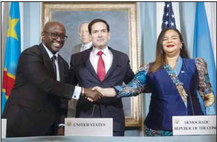
US Secretary of State Marco Rubio, (center), stands with Rwanda's Foreign Minister Olivier Nduhungirehe, left, and Democratic Republic of the Congo's Foreign Minister Therese Kayikwamba Wagner, (right), as they shake hands after signing a peace agreement at the State Department on June 27.

KIGALI, Rwanda, July 5, Rwanda's President Paul Kagame said Friday he was "thankful" for US mediation in his country's conflict with neighboring Congo following last week's agreement in Washington. But he warned that the success of the peace deal depends on goodwill from the warring parties. American mediators "are not the ones to implement what we have agreed," Kagame told reporters in the capital, Kigali. "You will never find Rwanda at fault with implementing what we have agreed to do," he said. "But if the side we are working with plays tricks and takes us back to the problem, then we deal with the problem like we have been dealing with it." The comments were Kagame's first public reaction to the peace deal facilitated by the US to help end the decades-long deadly fighting in eastern Congo. The deal will also help the US government and American companies gain access to critical minerals in the region. The agreement was signed at the State Department, with Secretary of State Marco Rubio standing between