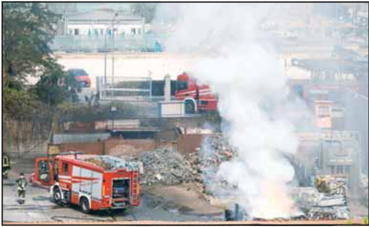
Firefighters monitor the area where a gas station exploded on the outskirts of Rome on July 4.

ROME, July 5, (Agencies): A gas station explosion early Friday in south-eastern Rome injured 45 people, Italy's ANSA news agency reported that the injured include 12 police officers, six firefighters, and three emergency rescuers who had arrived on the scene after an initial smaller blast. The explosion was heard across the Italian capital shortly after 8 am and sent up a huge cloud of dark smoke and fire that was visible from several areas of the city. Rome Mayor Roberto Gualtieri said that local police and firefighters rushed to the area after receiving a report of a gas leak. Two explosions followed after they arrived, he added. "Local police immediately evacuated a sports center nearby, while other officers evacuated buildings on the other side of the gas station, avoiding a much more serious tragedy," Gualtieri said. Police said that at least 24 residents were injured, including two who were in "severe conditions," and hospitalized at Rome's Casilino hospital. Fifteen firefighting teams were at the site trying to bring the fire under control. Rome prosecutors have begun an investigation into the cause of the explosion, which could be related to a previous gas leak during the unloading phase of liquefied petroleum gas at the station.