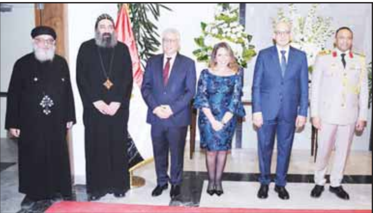
Egyptian Ambassador to Kuwait Osama Shaltout with guests from the Coptic Church in Kuwait and army personnel.

resulted in strengthening cooperation between the two sisterly countries. In press statements on the sidelines of the ceremony, Ambassador Shaltout disclosed that the volume of trade exchange between Kuwait and Egypt reached $3 billion annually, while Kuwaiti investments in Egypt amount to approximately $20 billion, making it among the largest foreign and Arab investments in Egypt. Ambassador Shaltout added that the investments achieved in recent years have been the result of economic and legislative reforms in Egypt and the creation of an attractive investment climate. He cited the imminent announcement of new investment projects and upcoming visits by economic delegations from both sides.