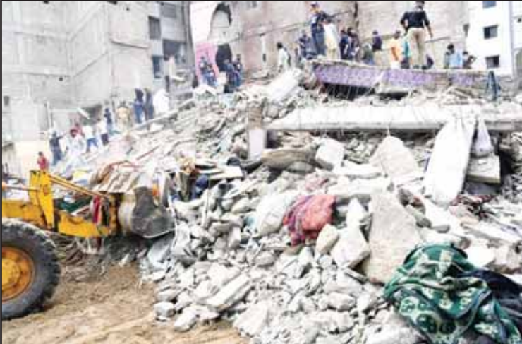
Rescuers work at the scene of a residential building collapse in Karachi, Pakistan, on July 4. (Xinhua)

ISLAMABAD, July 5, (Xinhua): The death toll from the collapse of a residential building in Pakistan's southern port city of Karachi rose to 17 as more bodies were recovered from the debris, a spokesperson of the state-owned rescue organization Rescue 1122 told Xinhua on Saturday morning. "The life detection equipment indicates that at least 10 people are still alive under the rubble. We're working urgently but carefully to rescue them," Hassan Ul Haseeb Khan, the operation's spokesperson, told Xinhua from the site. Rescue teams, equipped with five disaster response vehicles, two snorkels, several ambulances, cranes, and lifters, reached the site shortly after receiving distress calls, and over 100 personnel are actively participating in the operation to locate and retrieve victims from the debris, he added. He said the operation, which has continued for over 20 hours, may require another seven to eight hours to complete. Talking to Xinhua, Mayor of Karachi Murtaza Wahab said that they had previously declared the building "dangerous," directing the residents to evacuate it. The five-storey structure, located in the densely populated Lyari area, collapsed on Friday, causing scenes of panic and distress. Also: ISLAMABAD: At least six people were killed and 18 others injured when a passenger bus collided with a trailer in Pakistan's eastern Punjab province