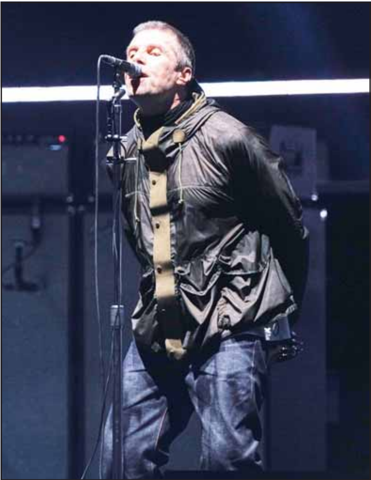
Liam Gallagher (above) and Noel Gallagher (below) from the band Oasis perform during their reunion concert on Friday, July 4, in Cardiff.