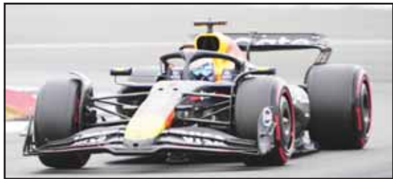
Red Bull driver Max Verstappen of the Netherlands in action during the qualifying for the British Formula One Grand Prix in Silverstone, England. Verstappen showed he had the pace when it mattered most as he beat Formula 1 title rivals Oscar Piastri and Lando Norris to claim pole position Saturday for the British Grand Prix.