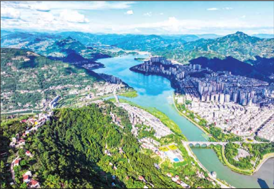
An aerial drone photo taken on July 2, 2025 shows a view of Hanfeng Lake and urban area of Kaizhou District in southwest China's Chongqing. Kaizhou is noted for a scenic internal lake named Hanfeng, with a capacity of 80 million cubic meters. This artificial lake was built after the completion of the Three Gorges Dam.