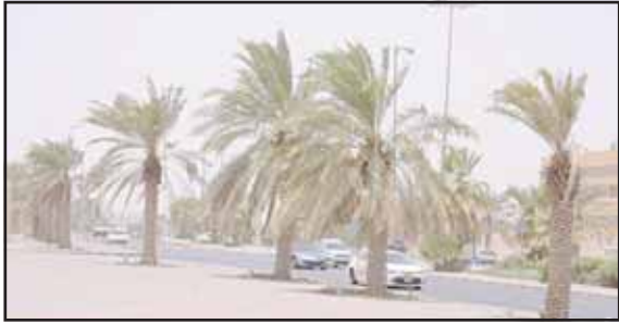
Winds whip across a Kuwait road, stirring up thick dust as motorists cautiously navigate through the hazy conditions.

KUWAIT CITY, July 5, (KUNA): Director of the Meteorological Department Dhirar Al-Ali stated that the country will be affected by moderate to active winds, occasionally strong, causing dust storms on Sunday before gradually calming down on Monday.