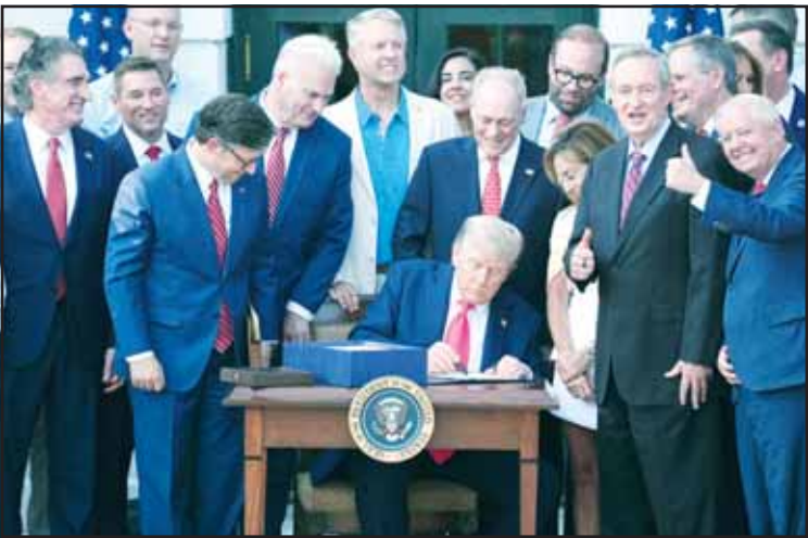
US President Donald Trump signs his signature bill of tax breaks and spending cuts at the White House on July 4, in Washington, surrounded by members of Congress.

legislation. Critics assailed the package as a giveaway to the rich that will rob millions more lower-income people of their health insurance, food assistance and financial stability. "Today, Donald Trump signed into law the worst job-killing bill in American history. It will rip health care from 17 million workers to pay for massive 2017 multitrillion-dollar tax cuts and cuts Medicaid and food stamps by $1.2 trillion. It provides for a massive increase in immigration enforcement. Congress' nonpartisan scorekeeper projects that nearly 12 million more people will lose health insurance under the law. The legislation extends Trump's