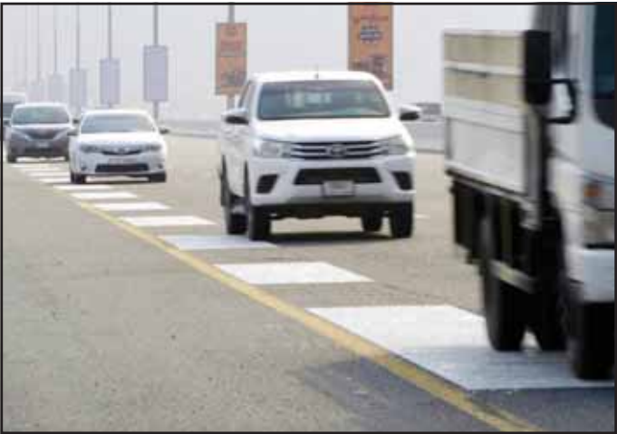
Vehicles drive over rumble strips that play Ludwig van Beethoven's Ninth Symphony on a highway in Fujairah, United Arab Emirates, Thursday, July 3. (AP)

FUJAIRAH, United Arab Emirates, July 5, (AP): The humble road rumble strip, used around the world to alert drifting drivers to potential hazards or lane departures, can play Beethoven on a mountain highway in the far reaches of the United Arab Emirates. For nearly a kilometer (a half mile) along the E84 highway - also known as the Sheikh Khalifa bin Zayed Road - motorists in the right-hand lane coming into the city of Fujairah can play Ludwig van Beethoven's Ninth Symphony where the rubber meets the road. "The 'Street of Music,' of course, is an art project that exists in some countries ... but we wanted this project to be in our country," said Ali Obaid Al Hefaiti, the director of Fujairah Fine Arts Academy, which recently wrapped up the project in collaboration with local authorities. "I think that the project is focused on spreading the