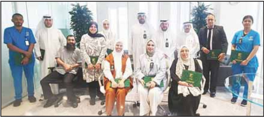
Kuwait University's employees behind the new digital medical records system being honored.

tion No. 79/2003, which regulated the use of the ministry's facilities and movable property by external parties. This decision is part of the state's efforts to enhance efficiency of resource utilization, achieve financial sustainability, and implement the comprehensive reform strategy. The ministry clarified that the suspension applies to all pending applications for the use of its facilities. Furthermore, it stated that, in accordance with the ministerial decision, all existing licenses and contracts between the ministry and entities using its facilities and movable property will be reviewed in line with Ministerial Resolution No. 79/2003, pending the adoption of the new regulations.