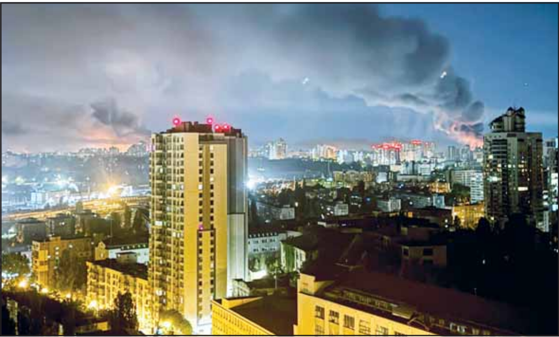
Smoke rises after a Russian strike on Kyiv, Ukraine on July 4.

or terror attack. Of the eight substations in the grid that were affected, including a major one in Prague, five renewed operations in less than two hours, CEPS said. Industry and Trade Minister Lukas Vlcek said the cause was likely a "mechanical malfunction." Most trams on the right bank of the Vltava River in Prague were halted, while the left bank was not affected. Some trains near Prague and other regions could not operate, causing delays but the situation was gradually getting back to normal. There were no immediate reports that Václav Havel Airport Prague, the city's international airport, was hit by the power outage. In downtown Prague, stores and restaurant that remained open accepted only payments in cash.