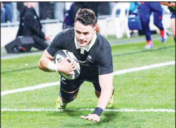
New Zealand's Will Jordan scores a try during their rugby test against France in Dunedin, New Zealand. (AP)

DUNEDIN, New Zealand, July 5, (AP): A French team lacking most of the leading players from its recent Six Nations victory fully stretched New Zealand before succumbing 31-27 in the first test on Saturday to trail 1-0 in the three-test series. France was a massive underdog with eight new caps in its lineup against the proven combinations of the three-time world champions. But France scored the first 10 points of the match, including the opening try through Mickael Gillard, and stuck with the All Blacks throughout, counter-punching every time New Zealand scored. Critics had angrily condemned France's decision to leave most of its top players at home because the tour of New Zealand conflicted with the end of the French club season. A mostly young and inexperienced French team fully answered those criticisms on Saturday. "There was a lot of outside noise saying we'd come out, we'd take 50, we didn't have the strength to play against a team like that," France's Canada-born lock Tyler