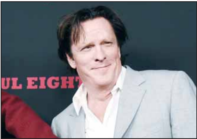
Actor Michael Madsen appears at the premiere of 'The Hateful Eight' in Los Angeles on Dec. 7, 2015.