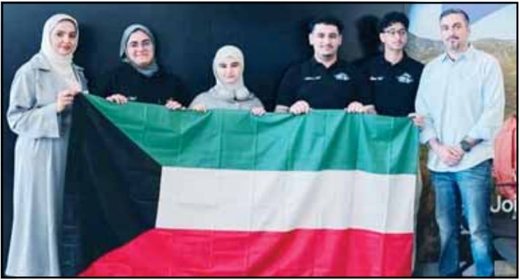
Kuwaiti student delegation at the 2025 International Chemistry Olympiad in Dubai.