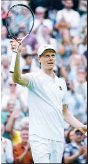
Jannik Sinner of Italy celebrates after beating Pedro Martinez of Spain during a third round men’s singles match at the Wimbledon Tennis Championships in London.

Sinner stayed as calm as can be - “I don’t think Sinner’s changed expressions once in this match,” John McEnroe observed on BBC’s telecast - and erased all four of those