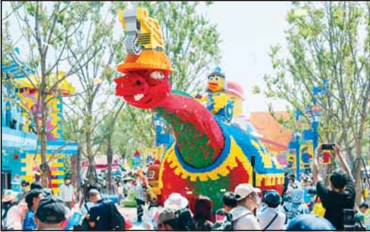
LEGO bricks models are seen at the Legoland Shanghai Resort in Shanghai, east China, July 5.