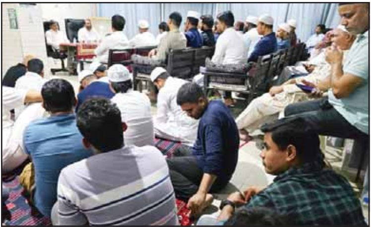
Large audiences attended programs focused on the spiritual and strategic legacy of the Prophet's migration.

KUWAIT CITY, July 5: Bangladesh Community Kuwait is a non-political, humanitarian and social organization. It has been working continuously for the welfare of helpless Bangladeshis in the diaspora. With the aim of developing the diaspora community and increasing unity and awareness among Bangladeshis, they recently organized a special exchange of views and cultural program.