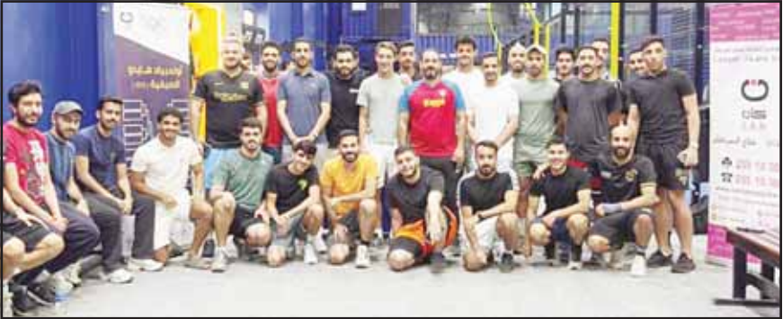
A shot of the teams participating in Summer Haido - CAN Olympics.

KUWAIT CITY, July 5, (KUNA): The Cancer Aware Nation (CAN) launched on Saturday the first activities of the 2025 Summer Haido - CAN Olympics, in co-operation with the Public Authority for Sports, under the slogan “Sports is Prevention.”