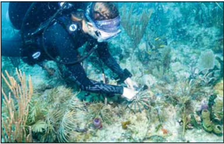
This image provided by the University of Miami Rosenstiel School shows a diver planting a crossbred coral species from Honduras on Tuesday, July 1, off the coast of Miami to help Florida's coral reefs become more resilient to climate change.