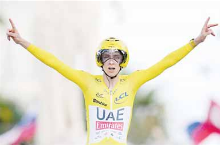
In this file photo, Tour de France winner Slovenia’s Tadej Pogacar celebrates as he crosses the finish line to win the twenty-first stage of the Tour de France cycling race in Nice, France.

flies.” So does Pogacar. His appetite for victory is insatiable and he has clearly established himself as the No. 1 rider in the world, drawing comparisons with the greatest of all time, Eddy Merckx. The Belgian great was known as “The Cannibal” for his ferocious taste for victory. The 80-year-old Merckx believes Pogacar has already surpassed him. “It’s obvious that he is now above me,” Merckx told L’Equipe newspaper after Pogacar won the world championship last year. “Deep down, I already thought as much when I saw what he did on the last Tour de France.” A fourth Tour win will draw Pogacar level with British rider Chris Froome for the fifth-most wins of all time. Merckx, Jacques Anquetil, Bernard Hinault and Miguel Indurain have won cycling’s biggest race five times. Pogacar’s team is formidable. He will be supported by experienced all-rounders and climbers. His main threat appears to come from two-time Tour champion Jonas Vingegaard, who leads Team Visma-lease a Bike.