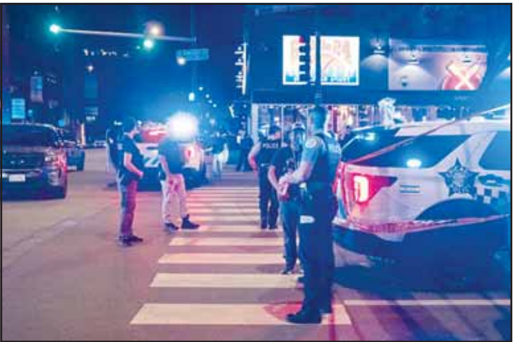
Chicago police investigate the scene of a shooting that took place at Artis Restaurant and Lounge located on Chicago Avenue in the River North neighborhood on July 3. (AP)

Four people have died from gunshot wounds and 14 others have been hospitalized following a drive-by shooting in Chicago, police said Thursday. At least three were in critical condition. The shooting happened late Wednesday in Chicago’s River North neighborhood. Several media outlets said it happened outside a restaurant and lounge that had hosted an album release party for a rapper. Someone opened fire into a crowd standing outside, police said, and the vehicle immediately drove away. No one was in custody, police said. Preliminary information from police said 13 women and five men ranging in age from 21 to 32 were shot, and that the dead included two men and two women. Those shot were taken to multiple hospitals, police said. (AP)