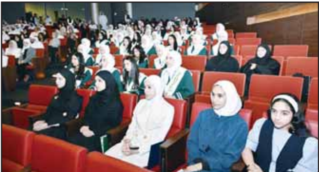
Part of the audience.