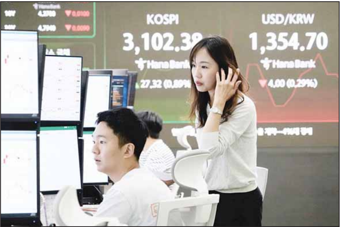
Currency traders watch monitors near a screen showing the Korea Composite Stock Price Index (KOSPI) and the foreign exchange rate between U.S. dollar and South Korean won, top right, at the foreign exchange dealing room of the KEB Hana Bank headquarters in Seoul, South Korea, Thursday, July 3, 2025. (AP)