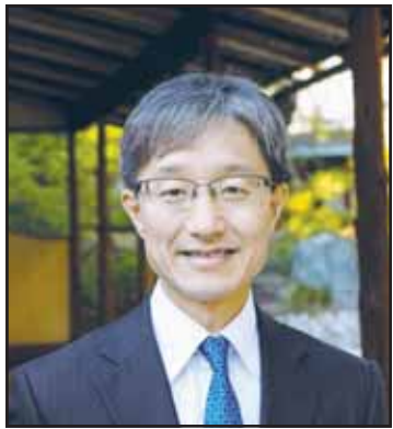
MUKAI Kenichiro Ambassador of Japan to the State of Kuwait

As the only country in the world that suffered atomic bombings, Japan has actively worked to strengthen the international nuclear non-proliferation regime. Japan has taken various opportunities to share the Japanese position