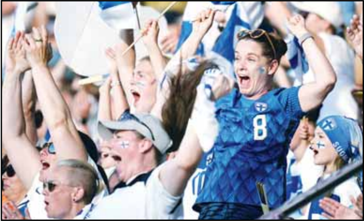
Finland fans celebrate after the Euro 2025, Group A, soccer match between Iceland and Finland at Arena Thun in Thun, Switzerland.