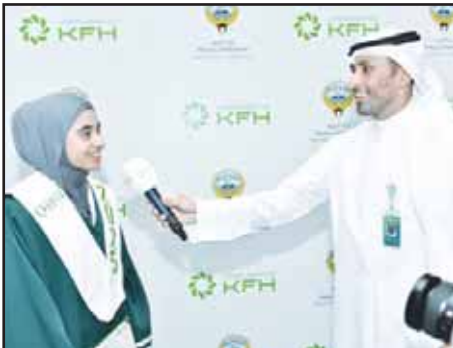
Interview with one of the top students.