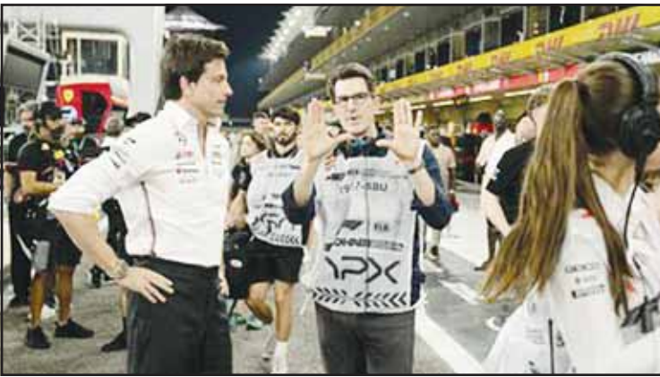
Behind the scenes images from F1: The Movie – on location in Abu Dhabi.

F1: The Movie, which is showing in cinemas now, was shot in Abu Dhabi on three separate occasions, totalling 29 filming days across iconic sites including Yas Marina Circuit, Zayed International Airport, and twofour54 Studios. Key racing sequences were shot live during the Grand Prix, a cinematic first showcasing