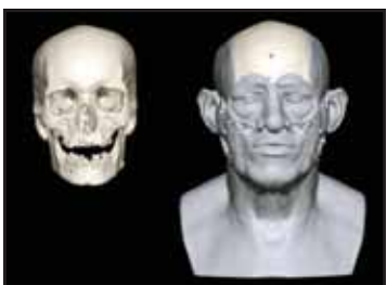
This image provided by researchers shows a facial reconstruction of a man radiocarbon dated to around 2855-2570 cal BCE found in Nuwayrat, Egypt.

WASHINGTON, July 3, Ancient DNA has revealed a genetic link between the cultures of ancient Egypt and Mesopotamia, according to research published Wednesday in the journal Nature. Researchers sequenced whole genomes from the teeth of a remarkably well-preserved skeleton found in a sealed funeral pot in an Egyptian tomb site dating to between 4,495 and 4,880 years ago. Four-fifths of the genome showed links to North Africa and the region around Egypt. But a fifth of the genome showed links to the area in the Middle East between the Tigris and Euphrates Rivers, known as the Fertile Crescent, where Mesopotamian civilization flourished. “The finding is highly significant” because it “is the first direct evidence