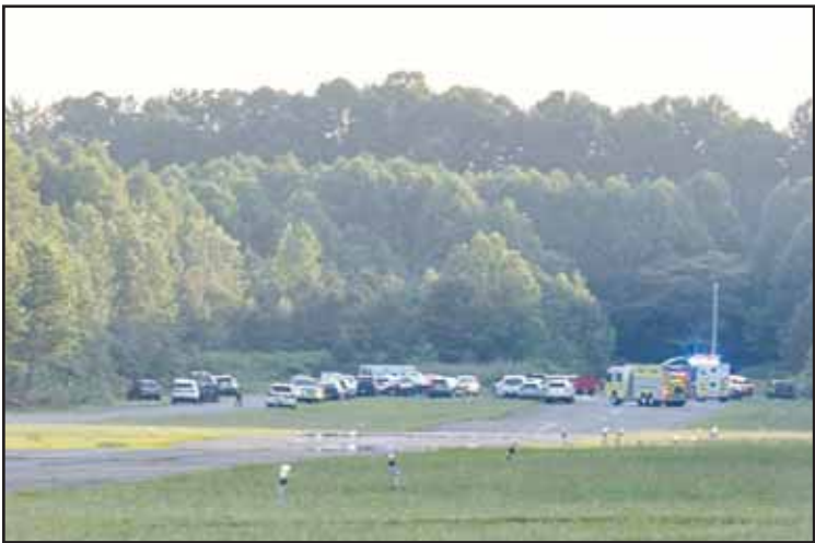
First responders work the scene at Cross Keys Airport in Gloucester County, NJ, after a skydiving aircraft went off the end of a runway and crashed into the woods on July 2.

Cuomo has given Republicans a new target as they seek to paint the entire Democratic Party as extreme and out of touch with voters heading into elections this fall in New Jersey and Virginia and next year’s high-stakes midterm elections. Since Mamdani’s win, they have repeatedly highlighted his most controversial past comments and positions, casting him as dangerous, a communist, and an antisemite, and trying to tie him to all other Democratic officials. That has included intense criticism of his platform, as well as blatantly xenophobic and Islamophobic attacks. If Mamdani wins, he would become the city’s furthest-left mayor in modern history. He ran on a platform that included opening city-run grocery stores, making buses free, freezing rent on rent-stabilized apartments, and raising property taxes on “richer and whiter neighborhoods.” Though he softened his stance as he campaigned, he called the New York Police Department “racist, anti-queer and a major threat to public safety” in a 2020 social media post, and in others, called for abolishing the entire prison system.