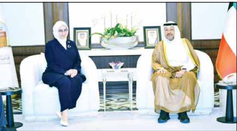
Farwaniya Governorate photo

At the end of April, the ministry addressed the Central Bank regarding the suspension of receiving all donations for charitable organizations; as well as two letters dated June 3, 2025 and June 17, 2025 regarding this matter.