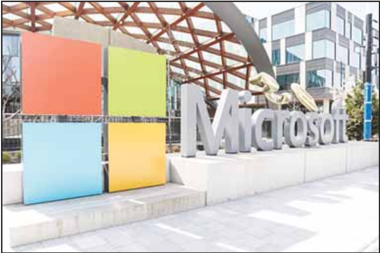
A Microsoft sign and logo are pictured at the company's headquarters, Friday, April 4, 2025, in Redmond, Wash.