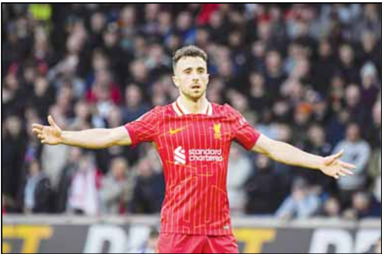
Liverpool’s Diogo Jota gestures during the English Premier League soccer match between Wolverhampton Wanderers and Liverpool at the Molineux Stadium in Wolverhampton, England.

The Portuguese soccer federation released a statement lamenting the deaths.