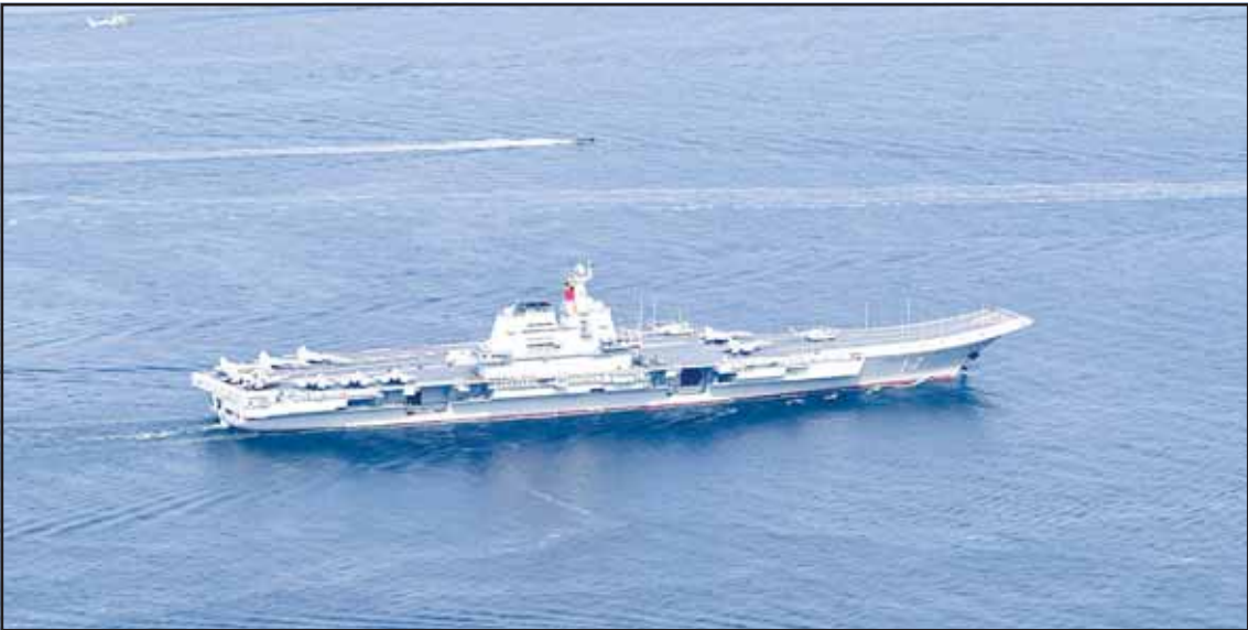
This photo shows aircraft carrier Shandong sailing in Hong Kong waters, south China, July 3, 2025. A fleet of the Chinese People's Liberation Army (PLA) Navy led by the aircraft carrier Shandong arrived in the Hong Kong Special Administrative Region (HKSAR) on Thursday morning, kicking off a five-day visit.

China's first domestically-built aircraft carrier arrived in Hong Kong on Thursday as part of a drive to drum up patriotism, days after the former British colony marked the 28th anniversary of its return to Chinese rule. The Shandong entered the city's waters alongside another vessel from its battle group in the early morning hours. According to state media, two destroyers and a frigate had accompanied the aircraft carrier into Hong Kong. The warships