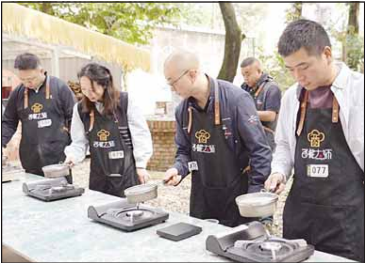
This video screenshot shows a scene during a coffee roasting course held in Qingtian, east China’s Zhejiang Province, on Oct. 29, 2024.

ly appeals to younger consumers. But in Qingtian, it’s loved by everyone, from the elderly to young children,” Yang said. “It’s common to see families dining together in Western-style restaurants here.” For Yang, a key reason behind Qingtian’s Western food boom lies in the growing reach of international logistics, which now enables chefs in Qingtian to source fresh and authentic ingredients from around the world with ease -- allowing them to recreate European flavors thousands of miles away. The returning overseas Chinese community is serving as a bridge bringing more foreign ingredients and products to Qingtian. The county has been hosting the Overseas Chinese Imported Commodities Expo since 2018 to promote its trade industry and introduce high-quality global products to the Chinese market.