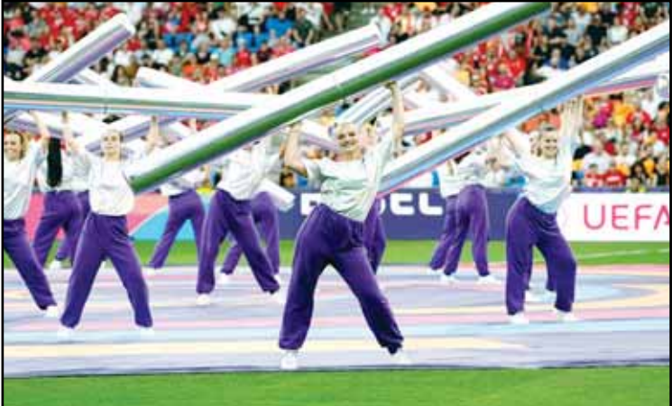
Dancers perform during the opening ceremony before the Euro 2025, Group A, soccer match between Switzerland and Norway at St. Jakob-Park in Basel, Switzerland.