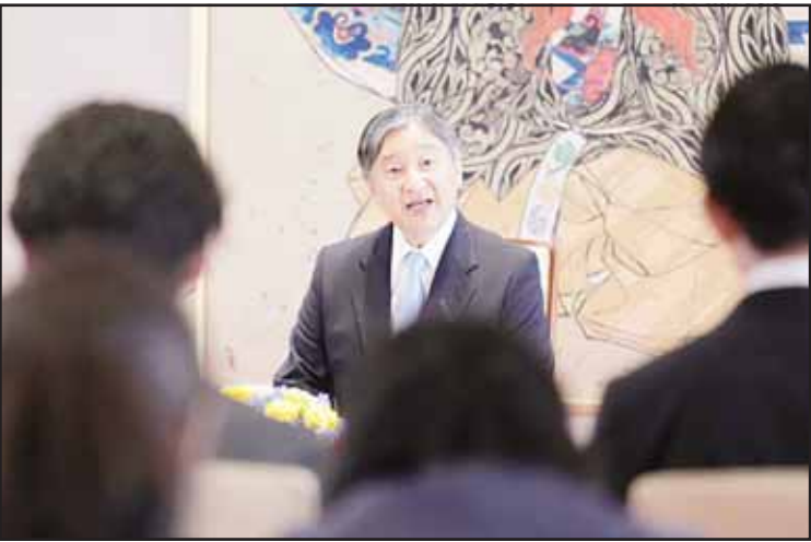
Japan's Emperor Naruhito speaks during a press conference in advance of his visit to Mongolia, at the Imperial Palace in Tokyo on July 2.

TOKYO, July 3, (Agencies): The election campaign for Japan's House of Councillors, or the upper house of the Diet, was officially launched on Thursday. The 17-day campaign will determine whether the ruling coalition, currently a minority in the lower house, can retain a majority in the chamber by securing at least 50 of the 125 contested seats. A total of 519 candidates have registered across electoral districts and proportional representation, including 152 women, nearly 30 percent of the total, marking the second-highest female representation on record, national broadcaster NHK reported. The central issue in the election is countering inflation, with parties proposing measures such as direct cash payments, reductions or abolition of the consumption tax, and interventions to address surging rice prices. Additional debate is expected on pensions, social security, declining birthrates, and foreign policy, including responses to U.S. tariff pressures. Voting is scheduled for July 20. The upper house has 248 members, and elections are held every three years to choose about half of the seats. The ruling coalition currently holds a total of 75 non-contested seats in the House of Councillors, which means they need to win 50 more seats in the current election to maintain a majority in the