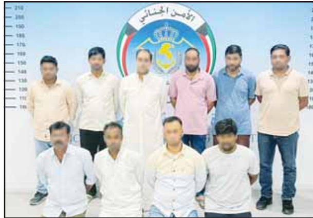
Photo shows the arrested PACI employee alongside two brokers and seven individuals accused of paying bribes in a major residency forgery case.