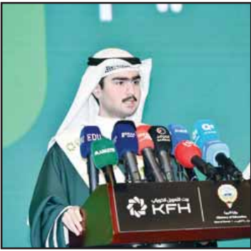
A word from one of the outstanding students.