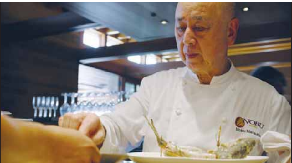
This image released by Vertical Entertainment shows chef Nobuyuki Matsuhisa in a scene from the documentary ‘Nobu.’

get the precision and the detail. At a certain point in the film, you see him correcting some of the chefs who work for him and it’s a pretty tough process because he’s a perfectionist. I wanted to show that. AP: There are many difficult moments in the film and you have to relive some pain from your past. How was that process for you Chef Nobu? Matsuhisa: Even though my life was pain, but I learned from this pain. Also I learned lots and lots of love from people who supported me. So