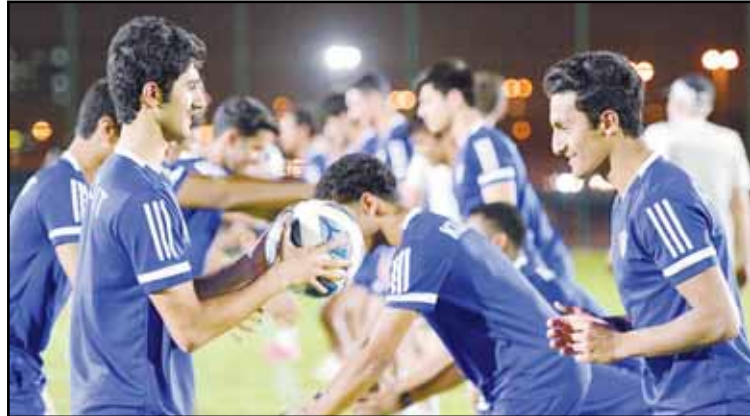
Kuwait U-23 players work out as part of their preparations for the qualifiers.