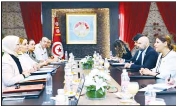
Kuwait's Assistant Foreign Minister for Human Rights Affairs Sheikhha Jawaher Al-Sabah in talks with Tunisian officials to strengthen bilateral ties.