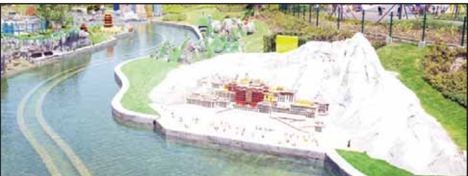
This photo taken on July 3, 2025 shows a view of the Legoland Shanghai Resort in Shanghai, east China.