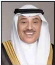
HH the Crown Prince