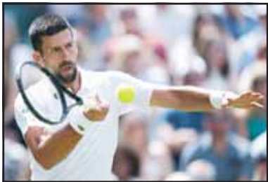
Novak Djokovic of Serbia returns to Daniel Evans of Britain during their second round men's singles match at the Wimbledon Tennis Championships in London.