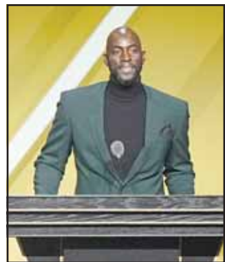
Kevin Garnett speaks as he is enshrined in the 2020 class of the Basketball Hall of Fame, Saturday, May 15, 2021, in Uncasville, Conn.

Along with screenings, the festival will host various private events including a tipoff viewing of "Tony Allen: The Grindfather" and a wrap party.