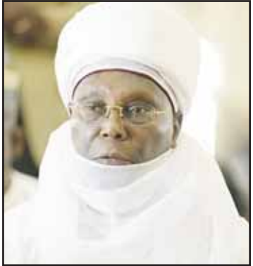
Atiku Abubakar, presidential candidate of the People's Democratic party, Nigeria's opposition party, during a traditional Friday prayers at the Moddibo Adama Mosque in Yola Nigeria on Feb 24, 2023. (AP)

LAGOS, Nigeria, July 3, (AP): Nigeria's key opposition leaders on Wednesday unveiled a new coalition which they say is aimed at unseating the ruling party in Africa's biggest democracy ahead of the 2027 presidential elections. The Africa Democratic Congress coalition, challenging President Bola Tinubu's All Progressives Congress party, is led by Atiku Abubakar and Peter Obi, both runners-up in the last presidential vote. They are joined by other top figures, including former federal lawmakers and former governors from the ruling party. "The coalition will stop Nigeria from becoming a one-party state," said David Mark, a former Senate president and the interim chairman of the alliance, at the unveiling in the capital, Abuja. Tinubu has been accused of plans to turn Nigeria to a one-party state by allegedly using state mechanisms to convince high-profile politicians to defect from opposition parties to the governing party. Although the Nigerian leader has denied the allegations, some of his closest allies, including within ruling party