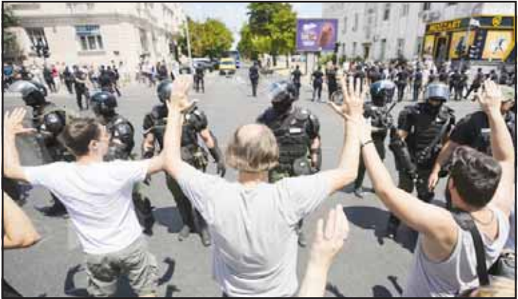
Serbian gendarmerie officers remove a street blockade that was set up as part of a protest over a spate of arrests of anti-government protesters after a massive rally demanding an early parliamentary election in Belgrade, Serbia on June 30.

BELGRADE, Serbia, July 3, Serbian police said they detained 79 university students and other protesters as they broke up street blockades in several cities that are part of persistent dissent against President Aleksandar Vucic’s populist government. Officers in riot gear intervened late Wednesday and early Thursday in the capital, Belgrade, the northern city of Novi Sad and the southern cities of Nis and Novi Pazar. Authorities denied reports of police brutality and excessive force against demonstrators. University students behind the protests said police charged and injured many peaceful demonstrators. Witnesses told local media that riot police beat up protesters with batons and shields and that four students were hospitalized, including one with a broken clavicle. Four officers were injured and a police vehicle was damaged, the Interior Ministry said in a statement, noting officers “acted in accordance with the law” while responding to the unrest Wednesday and early Thursday. Tensions in the Balkan country have soared since a rally Saturday demanding early parliamentary