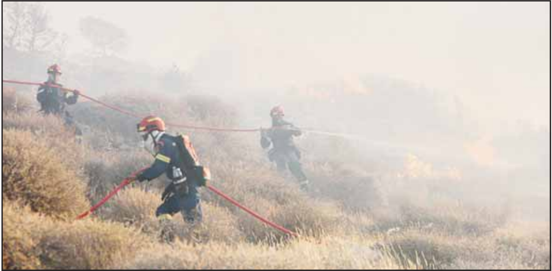
Firefighters use a hose as they try to extinguish a blaze near the town of Ierapetra on the south coast of Crete island, Greece on July 3, as a fast-moving wildfire prompted authorities to clear villages and coastal areas, officials said. (AP)

Fifteen people were taken to the hospital after a skydiving aircraft radioed it was having engine trouble after takeoff and crashed on landing near an airport in southern New Jersey on Wednesday, according to authorities. The single engine Cessna 208B was carrying 15 people when it crashed at about 5:30 p.m. at the Cross Keys Airport, about 21 miles (34 kilometers) southeast of Philadelphia, according to the Federal Aviation Administration. “The plane did try to circle back and attempt a landing we are told but was unsuccessful in that attempt,” Andrew Halter, with Gloucester County Emergency Management, said during a news conference Wednesday night. The injuries ranged from minor to critical and the plane was severely damaged, Halter said. Some of the people on board were covered in jet fuel and had to be decontaminated before being taken to the hospital, he said. (AP)