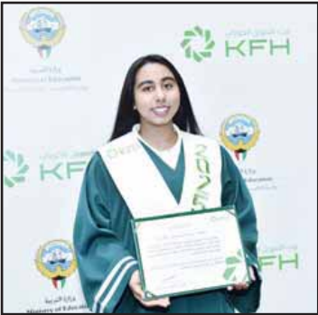
Outstanding student with a certificate of appreciation from Kuwait Finance House.