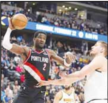
In this file photo, Portland Trail Blazers center Deandre Ayton (2) and Denver Nuggets center Nikola Jokic (15) vie for the ball in the second half of an NBA basketball game in Denver.