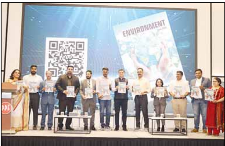
Digital magazine launch promoting sustainability.

One of the most engaging segments of the event was a student presentation titled “The Cost of Space Tourism”, delivered by Elevate 2025 competition