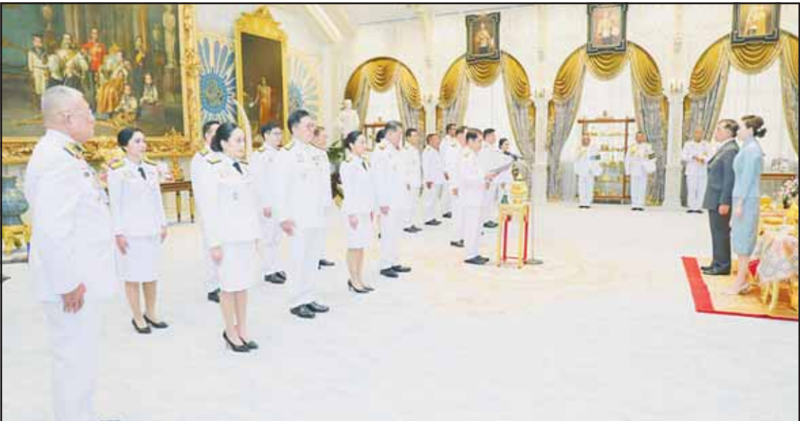
In this photo released by Bureau of the Royal Household, Thailand's Acting Prime Minister Suriya Jungrunreangkit and his Cabinet members to take their oath in front of Thailand's King Maha Vajiralongkorn and Queen Suthida at Ampornsan Throne Hall in Bangkok on July 3.

defected to the ruling party in recent months, and opposition politicians have coalesced to contest Tinubu's second term. The new coalition is reminiscent of the alliance that defeated Nigeria's former ruling party, the Peoples Democratic Party, in 2015 after an uninterrupted 16-year rule. As was the case in 2015, many see the current administration as not delivering on their key promises to improve the country's ailing security and economic sectors. Tinubu's government has battled the fallout of unpopular economic reforms after removing decades-long subsidies and floating the country's currency. The reforms have sparked an inflation crisis as the country deals with a resurgence of attacks by armed groups across the country. Cheta Nwanze, lead partner at SBM Intelligence, a geo-political consultancy, said only a united opposition bloc stands a chance of unseating Tinubu in 2027. "You cannot remove a sitting government if the opposition is disunited," Nwanze said.