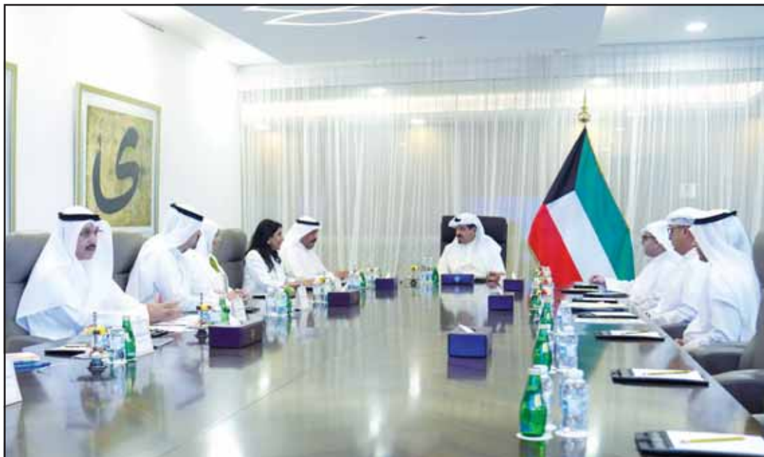
HH the PM presides over a ministerial meeting focused on implementing strategic Kuwait-China projects.