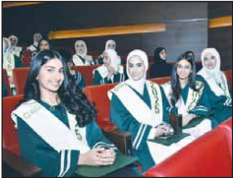
Top & above: A group of outstanding students.