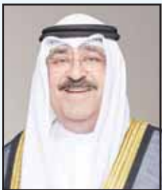
HH the Amir