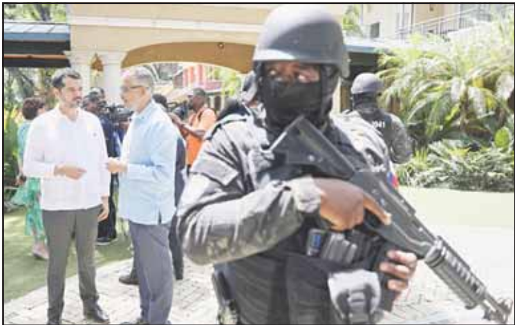
Security guards stand watch as Haiti's Prime Minister Alix Didier Fils-Aime, center, talks with the Mexico's Charge d'Affaires Jesus Cisneros after attending an event marking one year since the start of the Multinational Security Support Mission in Port-au-Prince, Haiti on June 26. (AP)

UNITED NATIONS, July 3, (AP): Haiti's gangs have gained "near-total control" of the capital and authorities are unable to stop escalating violence across the impoverished Caribbean nation, senior UN officials warned Wednesday. An estimated 90% of the capital Port-au-Prince is now under control of criminal groups who are expanding attacks not only into surrounding areas but beyond into previously peaceful areas, Ghada Fathy Waly, executive director of the UN Office on Drugs and Crime, told the UN Security Council. "Southern Haiti, which until recently was insulated from the violence, has seen a sharp increase in gang-related incidents," she said. "And in the east, criminal groups are exploiting land routes, including key crossings like Belladere and Malpasse, where attacks against police and customs officials have been reported." Waly said the state's authority to govern is rapidly shrinking as gang control expands with cascading effects. Criminal groups are stepping