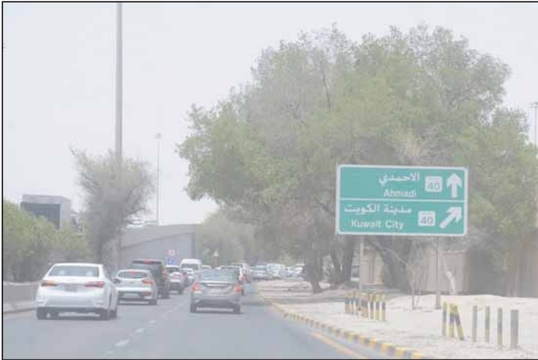
Motorists battle swirling dust and low visibility on Kuwait's roads.

The minister reaffirmed the Ministry's commitment to countering the drug threat and safeguarding national security through local and international partnerships.