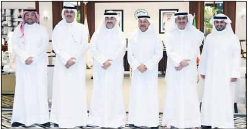
Farwaniya Governorate photo

He emphasized that the KRCS board is committed to establishing a comprehensive strategy to train and qualify staff and volunteers to the highest standards. The goal, he noted, is to ensure their effective performance, particularly during emergencies and disasters.