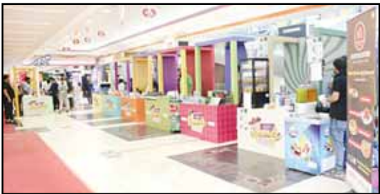
Lulu Hypermarkets in Kuwait kick off summer surprises with festive flair.