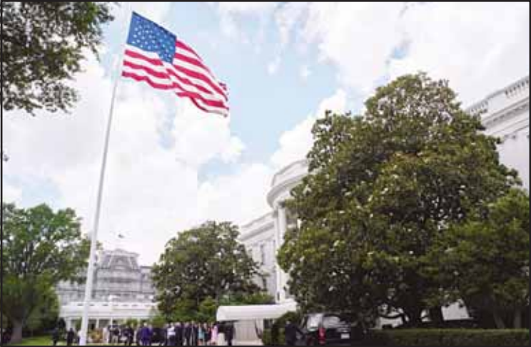
A new flag pole on the South Lawn of the White House on June 18 in Washington.