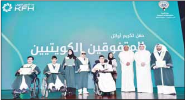
Honoring outstanding special education students.