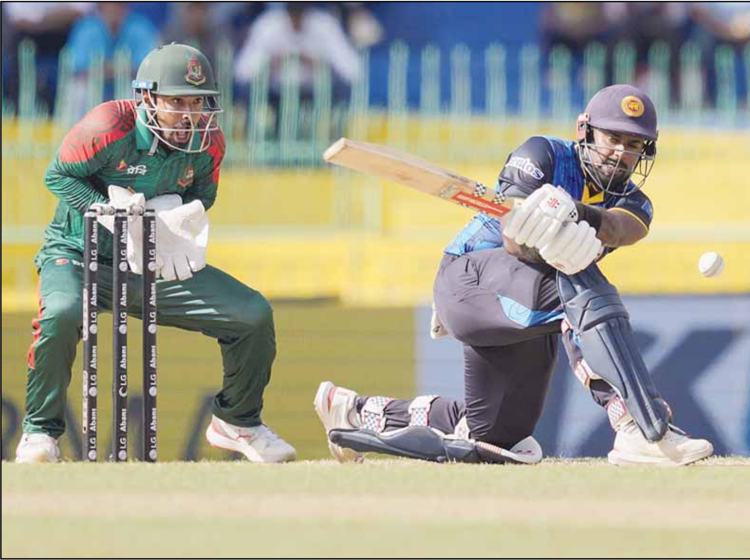
Sri Lanka’s Charith Asalanka plays a shot during the first ODI cricket match between Sri Lanka and Bangladesh in Colombo, Sri Lanka.