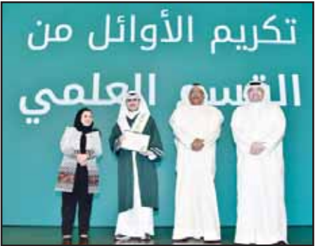
Honoring one of the outstanding students.