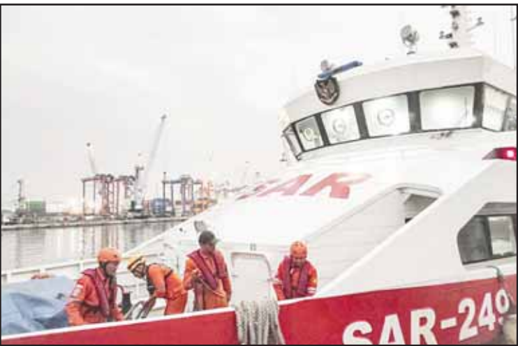
Members of Search And Rescue (SAR) teams depart for search and rescue mission from Tanjung Perak port in Surabaya, East Java, Indonesia on July 3.