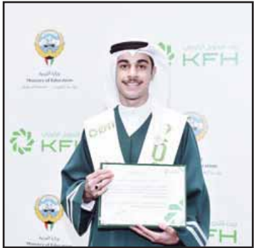
Outstanding student with a certificate of appreciation from Kuwait Finance House.