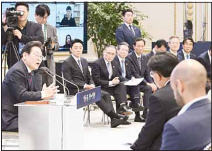
South Korean President Lee Jae-myung delivers a speech during a news conference to mark his first 30 days in office at Yeongbingwan of Blue House in Seoul, South Korea on July 3.

TOKYO, July 3, (Agencies): South Korean President Lee Jae-myung said Thursday his administration will work to improve relations with North Korea based on cooperation with the US, but acknowledged that dialogue with Pyongyang looks difficult for now, Yonhap News Agency reported. Speaking at a press conference marking his first month in office, Lee emphasized the importance of dialogue and cooperation with Pyongyang, saying "We should improve relations with North Korea based on fixed coordination with the US." While acknowledging the challenges of resuming talks due to longstanding hostility and distrust, Lee expressed hope that Seoul's recent suspension of anti-North Korea loudspeaker broadcasts near the border could open the door to renewed engagement. He added, "When we decided to suspend the loudspeaker broadcasts toward North Korea, I was concerned. But (the North's) response was very swift and exceeded expectations."