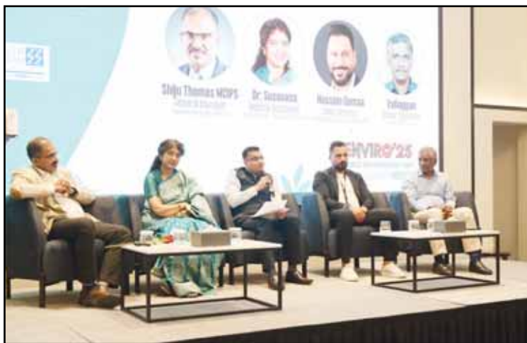
Panelists share practical insights.

A panel discussion on the theme “Sustainability and Well-being in the Real World” featured distinguished