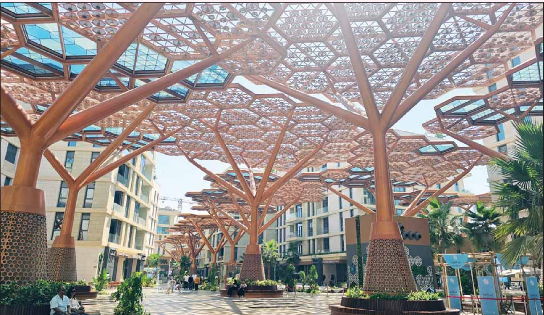
The walkway features a collection of crystals embedded in its floor and is adorned with tropical plants.