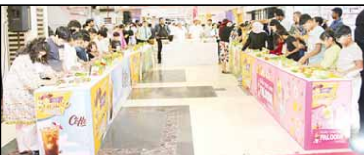
Community contests highlight Lulu's festive summer start.

Those looking to stay cool at home can benefit from attractive air conditioner deals, including free delivery and installation. Health-conscious