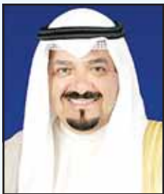
HH the Prime Minister