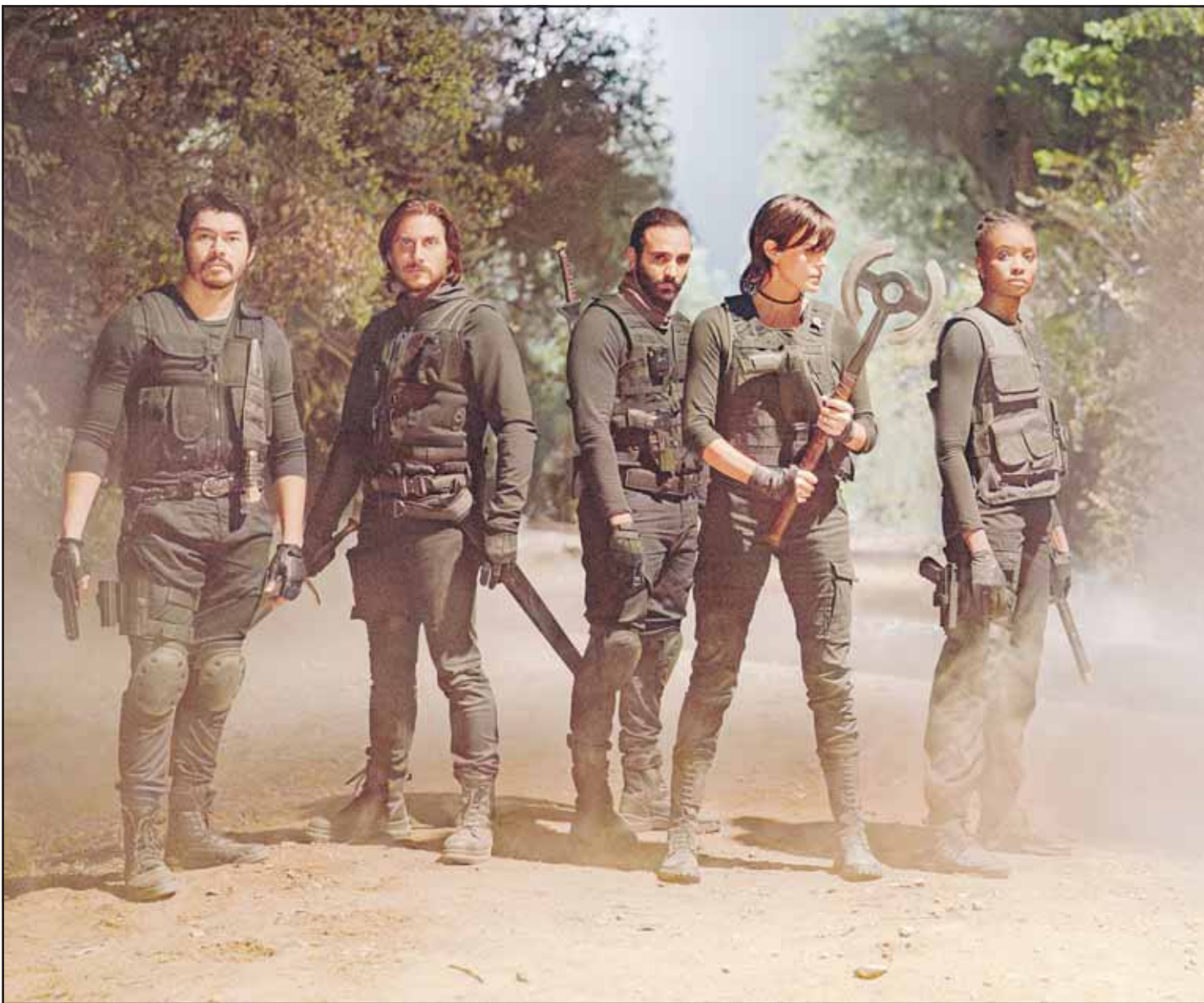
This image released by Netflix shows, (from left), Henry Golding, Luca Marinelli, Marwan Kenzari, Charlize Theron and KiKi Layne in a scene from 'The Old Guard 2.'