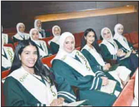
Top & above: A group of outstanding students.