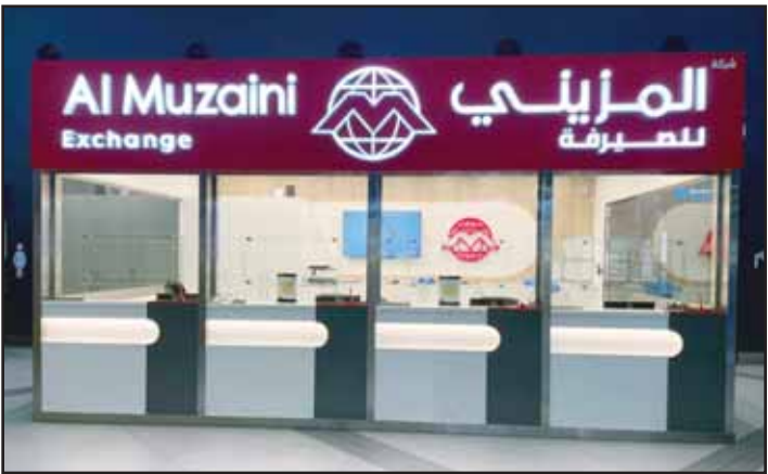
Al Muzaini Exchange latest branch at Kuwait International Airport – Terminal 4.

It is worth mentioning that NBK is a key supporter and partner in all CBK’s initiatives and campaigns aiming to raise financial awareness and spread banking culture among all segments of society. As a leading financial institution in Kuwait and across the region, NBK frequently organizes various activities that contribute to raising awareness about all topics related to the banking sector. It also organizes various activities and training courses on combating fraud and financial crimes.