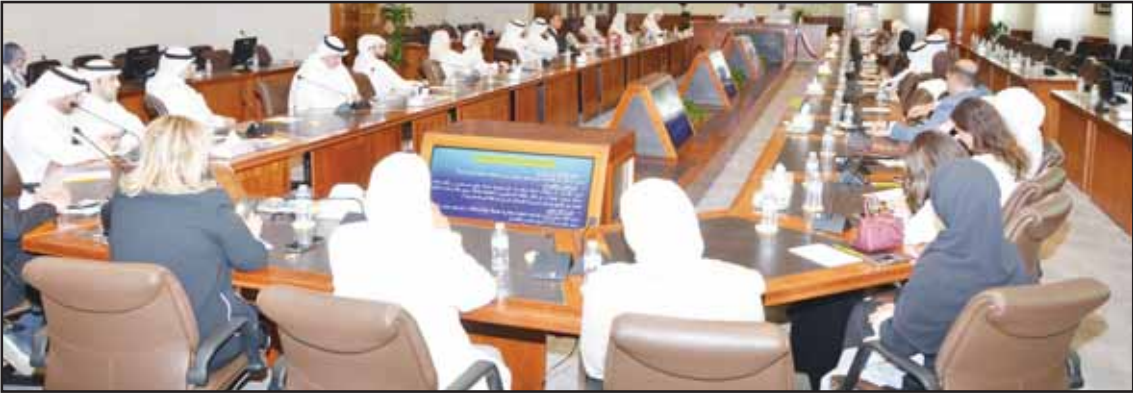
Photo during the specialized legal seminar organized by the Kuwait Commercial Arbitration Center.