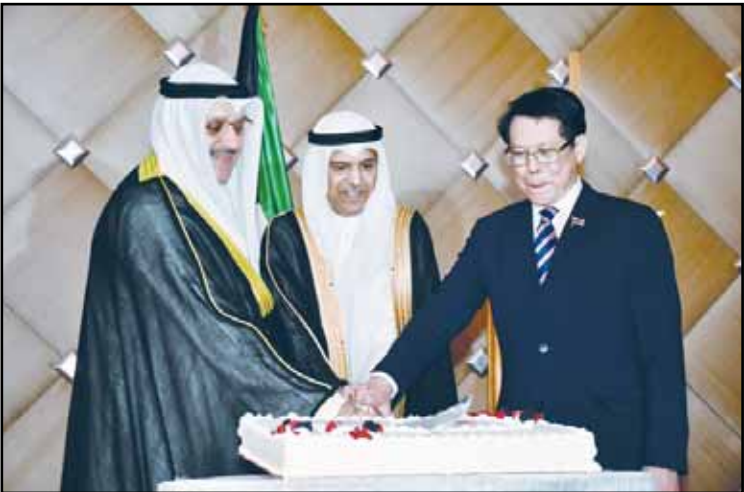
Assistant Foreign Minister for Asian Affairs Ambassador Samih Jawhar Hayat at the cake-cutting ceremony.