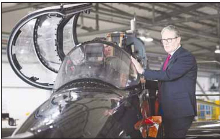
Britain’s Prime Minister Keir Starmer is shown a Hawk T2, the RAF’s premier fast jet trainer during a visit to RAF Valley, Anglesey, north Wales on June 27. (AP)

LONDON, July 1, (AP): British Prime Minister Keir Starmer marks a year in office this week, fighting a rebellion from his own party in a vote Tuesday on welfare reform and reckoning with a sluggish economy and rock-bottom approval ratings. It’s a long way from the landslide election victory he won on July 4, 2024, when Starmer’s center-left Labour Party took 412 of the 650 seats in the House of Commons to end 14 years of Conservative government. In the past 12 months, Starmer has navigated the rapids of a turbulent world, winning praise for rallying international support for Ukraine and persuading US President Donald Trump to sign a trade deal easing tariffs on UK goods. But at home his agenda has run into the rocks as he struggles to convince British voters – and his own party – that his government is delivering the change that it promised. Inflation remains stubbornly high and economic growth low, frustrating efforts to ease the cost of living. Starmer’s personal approval ratings are approaching those of Conservative Prime Minister Liz Truss, who lasted just 49 days in office in 2022 after her tax-cutting budget