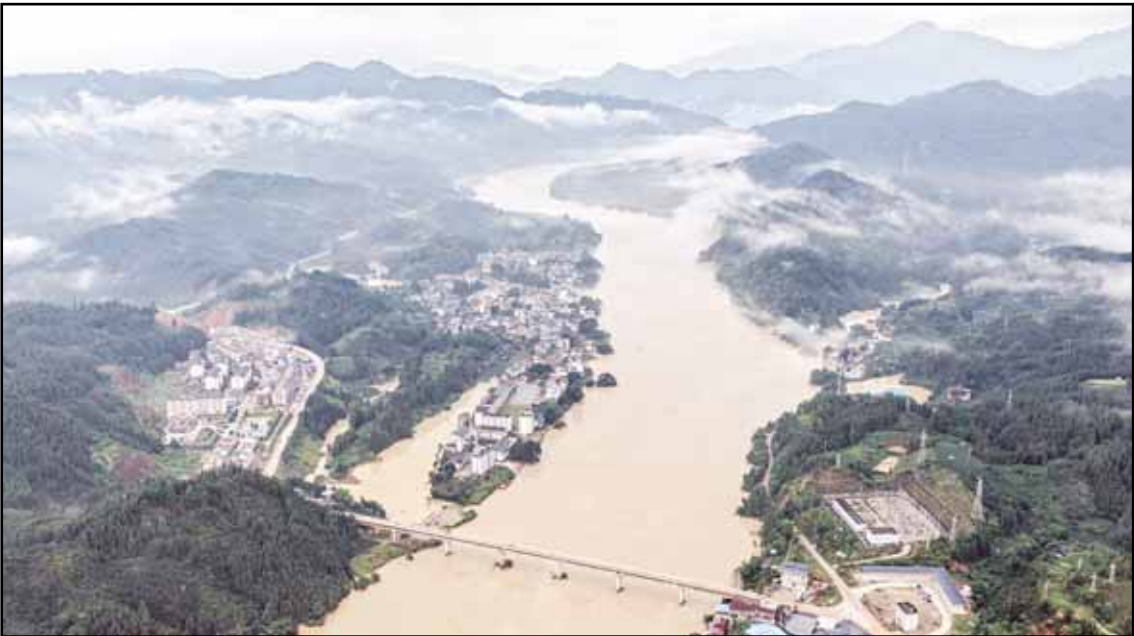
An aerial drone photo taken on June 25, 2025 shows the flooded Liangkou village in Sanjiang Dong Autonomous County, south China's Guangxi Zhuang Autonomous Region.