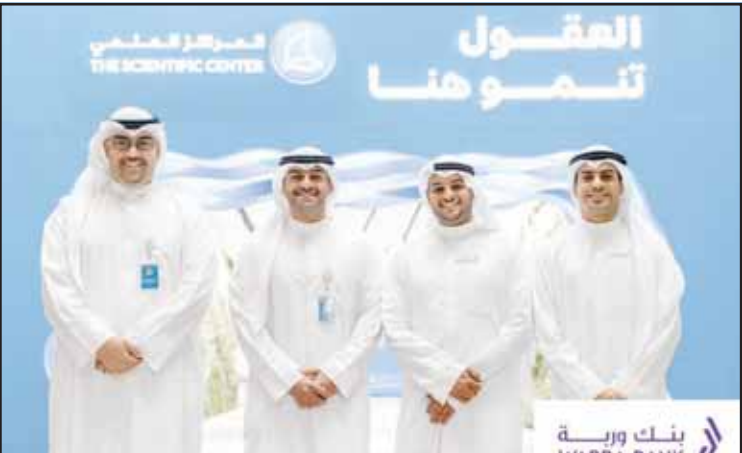
Top & above: Photos from the event.

to expand the reach of our educational initiatives and positively impact more participants in a meaningful and lasting way.”