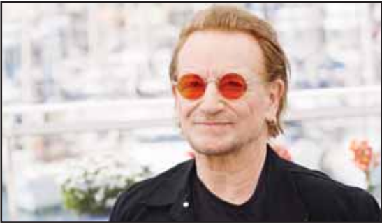
Bono poses for photographers at the 78th international film festival, Cannes, southern France, May 17, 2025.

WASHINGTON, July 1, Former Presidents Barack Obama and George W. Bush delivered rare open criticism of the Trump administration - and singer Bono recited a poem - in an emotional video farewell Monday with staffers of the US Agency for International Development. Obama called the Trump administration’s dismantling of USAID “a colossal mistake.” Monday was the last day as an independent agency for the six-decade-old humanitarian and development organization, created by President John F. Kennedy as a peaceful way of promoting US national security by boosting goodwill and prosperity abroad. Secretary of State Marco Rubio has ordered USAID absorbed into the State Department on Tuesday. The former presidents and Bono spoke with thousands