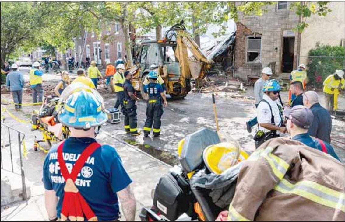
Officials work the scene in the Nicetown area of Philadelphia on June 29 after an explosion damaged several homes.