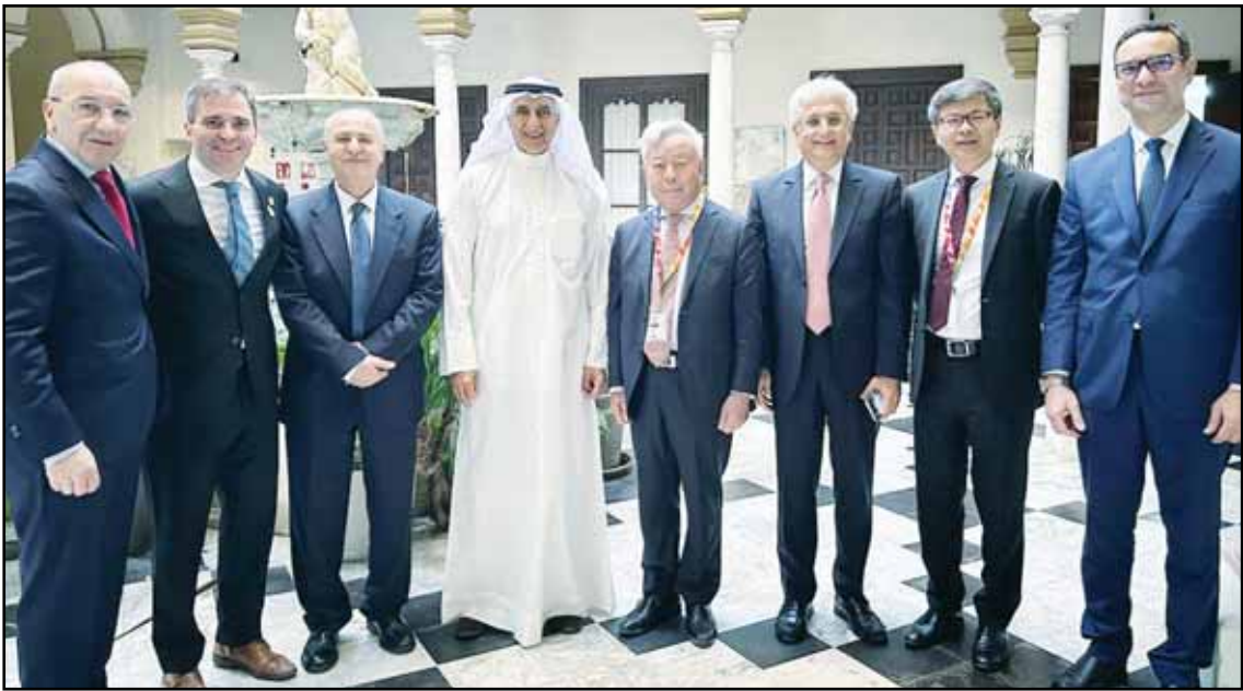
A group photo of the delegation from the Arab Fund for Economic and Social Development and the Asian Infrastructure Investment Bank following the signing ceremony of a Memorandum of Understanding between the two sides.