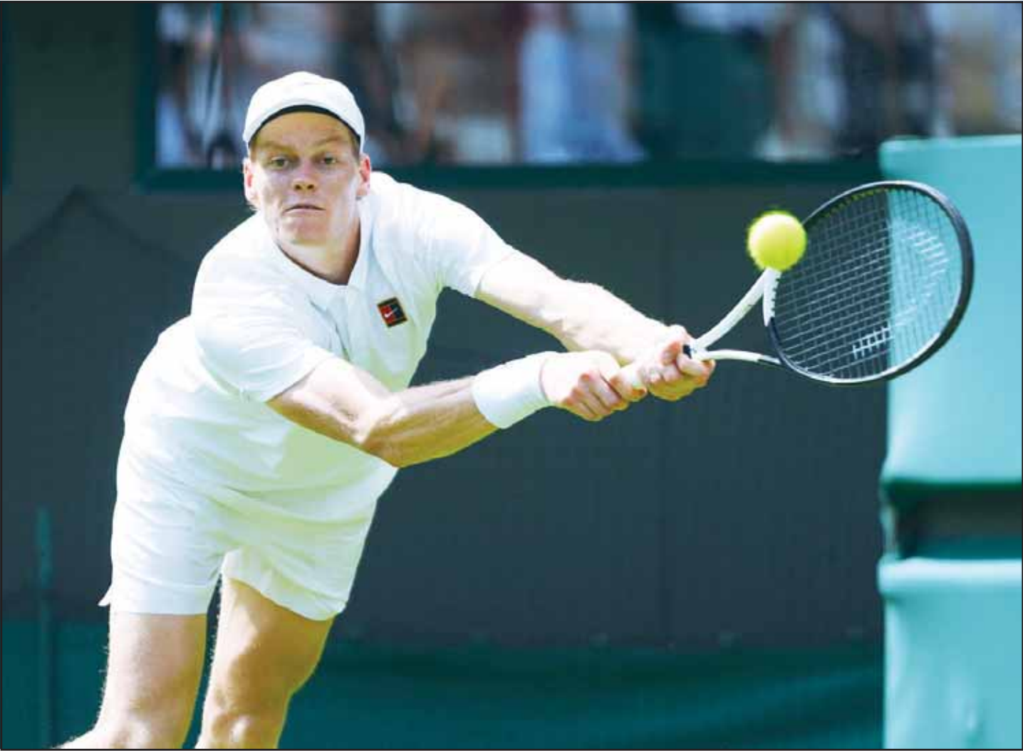
Jannik Sinner of Italy plays a return to Luca Nardi of Italy during their first round men’s singles match at the Wimbledon Tennis Championships in London. (AP)

Krejcikova comes back to beat Eala of Philippines