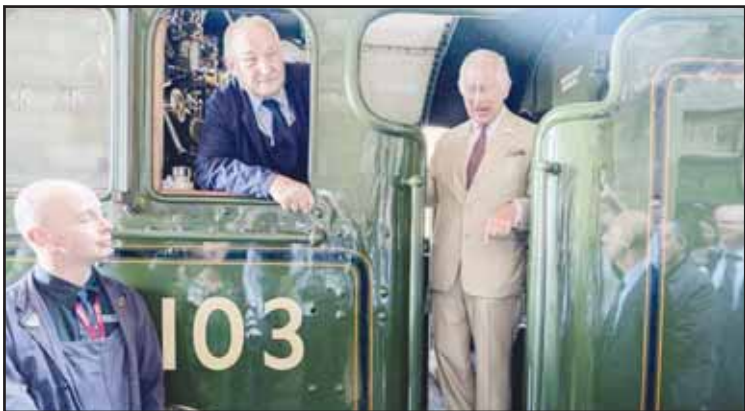
Britain’s King Charles III, arrives by royal train, pulled by the Flying Scotsman, at Pickering Heritage Railway Station, the southern terminus of the North Yorkshire Moors Railway, for a visit to Pickering in Yorkshire, England on June 12, 2023. (AP)

LONDON, July 1, (AP): The Royal Train will soon leave the station for the last time. King Charles III has accepted it’s time to decommission the train, whose history dates back to Queen Victoria, because it costs too much to operate and would have needed a significant upgrade for more advanced rail systems, Buckingham Palace said Monday. “In moving forwards we must not be bound by the past,” said James Chalmers, the palace official in charge of the king’s financial affairs. “Just as so many parts of the royal household’s work have modernized and adapted to reflect the world of today, so too the time has come to bid the fondest of farewells, as we seek to be disciplined and forward-looking in our allocation of funding.” The train, actually a suite of nine railcars that can be hitched to commercial locomotives, will be decommissioned sometime before the current