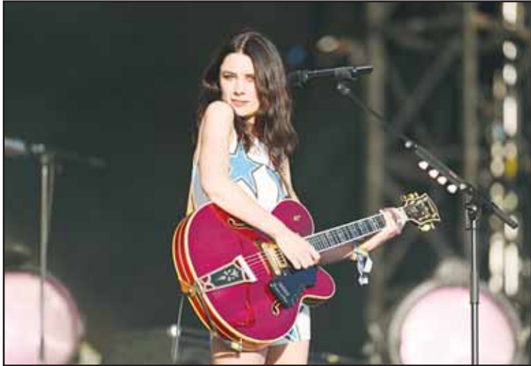
Ellie Rowsell of the rock band Wolf Alice performs during the Glastonbury Festival in Worthy Farm, Somerset, England, Sunday, June 29, 2025.

zbollah flag at a concert in London in November. He denies the charge, and Kneecap has accused critics of trying to silence the band because of its support for the Palestinian cause. Kneecap’s energetic set included plenty