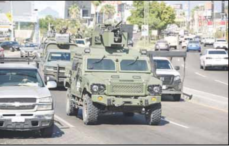
National Guards patrol the streets in Culiacan, Sinaloa state Mexico on Oct 14, 2024. (AP)

MEXICO CITY, July 1, (AP): Four decapitated bodies were found hanging from a bridge in the capital of western Mexico’s Sinaloa state on Monday, part of a surge of cartel violence that killed 20 people in less than a day, authorities said. A bloody war for control between two factions of the powerful Sinaloa Cartel has turned the city of Culiacan into an epicenter of cartel violence since the conflict exploded last year between the two groups: Los Chapitos and La Mayiza. Dead bodies appear scattered across Culiacan on a daily basis, homes are riddled with bullets, businesses shutter and schools regularly close down during waves of violence. Masked young men on motorcycles watch over the main avenues of the city. On Monday, Sinaloa state prosecutors said that four bodies were found dangling from the freeway bridge leading out of the city, their heads in a nearby plastic bag. Also: MEXICO CITY: Hurricane Flossie has continued to strengthen off Mexico’s southwestern Pacific coast with maximum sustained winds of 140 kph (85