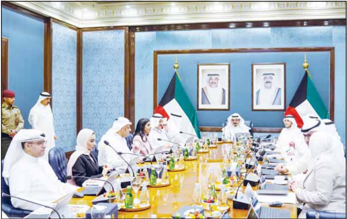
His Highness the Prime Minister Sheikh Ahmad Abdullah Al-Ahmad Al-Sabah chairs the weekly Cabinet meeting on Tuesday.

Scan QR code to visit the website: aljarallah.com