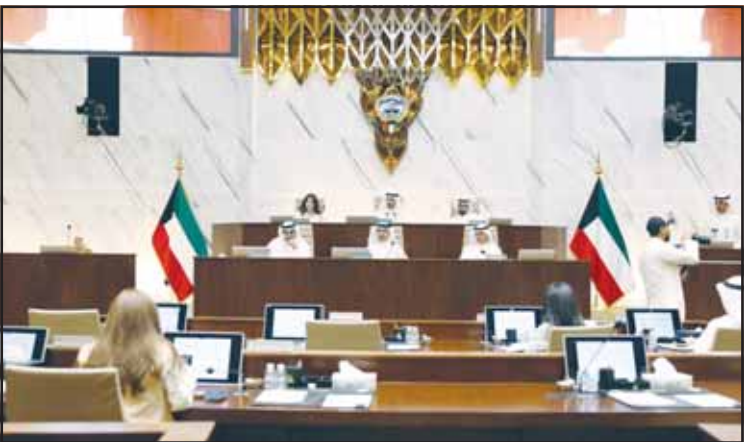
The second regular session of the council in the fourth legislative term presided over by Deputy Chairman of the Municipal Council Khaled Al-Mutairi.

KUWAIT CITY, July 1: Deputy Chairman of the Municipal Council Khaled Al-Mutairi presided over the second regular session of the council in the fourth legislative term. During the session, the council approved the following: ■ Request of the Ministry of Electricity, Water and Renewable Energy to allocate overhead lines to connect the "Shagaya Z" and "Wafra Z" main transformer stations; ■ Request of the same ministry to add an area to Plot No. 39 in Block 24 in Jleeb Al-Shuyoukh; ■ Request of the Public Authority for Roads and Transportation (PART) to amend the road network design to connect the Special Education Schools Complex with the surrounding roads in South Oyoum; ■ Request of the same ministry to add an area to Plot No. 1 in Block 70 in Farwaniya; ■ Request of the same ministry to rezone part of Al-Mubarakiya suburb (formerly Plot 15); such that the size after rezoning will be 84,800 square meters; ■ Request of a company to amend the subdivision project in the plot located