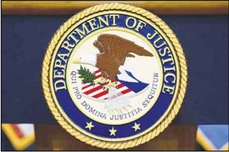
The US Department of Justice logo is seen on a podium before a press conference with Attorney General Pam Bondi on May 6, at the Justice Department in Washington.

WASHINGTON, July 1, The Justice Department announced criminal charges Monday in a scheme by North Korea to fund its weapons program through the salaries of remote information technology workers employed unwittingly by US companies. The charges arose from what law enforcement officials described as a nationwide operation that also resulted in the seizure of financial accounts, websites and laptops that were used to carry out the fraud. Separate cases in Georgia and Massachusetts represent the latest Justice Department effort to confront a persistent threat that officials say generates enormous revenue for the North Korean government and in some cases affords workers access to sensitive and proprietary data from the American corporations that hire them. The scheme involved thousands of workers who, armed with stolen or fake identities, were dispatched by the North Korean government to find work as remote IT employees at American companies, including Fortune 500 corporations. The companies were duped into believing that the workers they hired were based in the U.S. when many were actually stationed in North Korea or China, and the wages the victimized companies paid were transferred into accounts controlled by