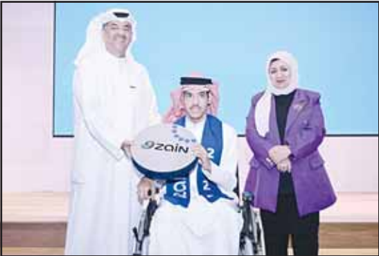
Honoring one of the top students.