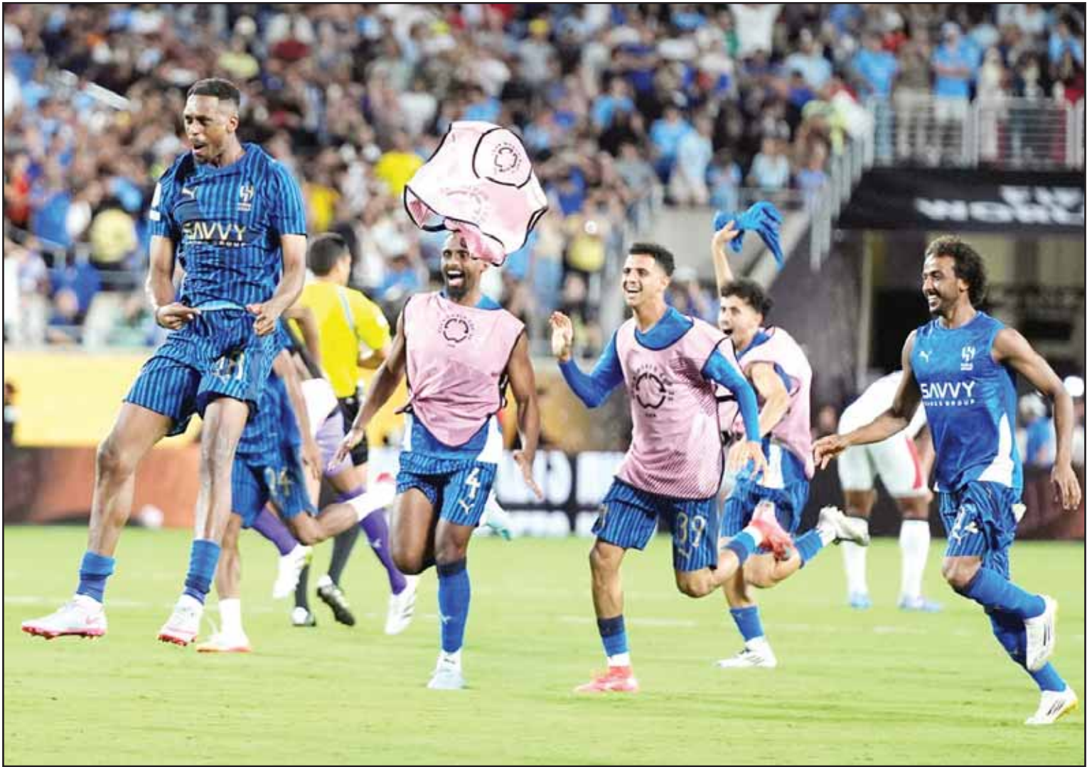
Al Hilal players celebrate following the Club World Cup round of 16 soccer match between Manchester City and Al Hilal in Orlando, Fla.

Manchester City nearly won it regulation in the final seconds of added time on a counterattack that was thwarted by a hard challenge.