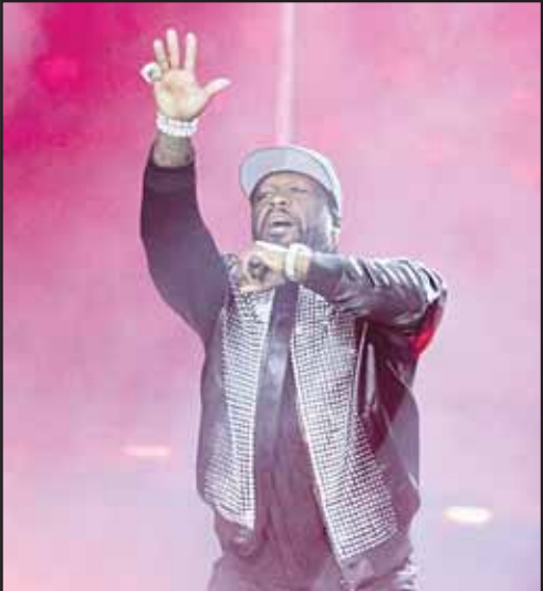
US rapper Curtis James Jackson III ('50 Cent') performs at the Heinz-von-Heiden-Arena during a concert in Hanover, Germany, on Saturday, June 28, 2025, as part of his 'Legacy Tour' through Europe.