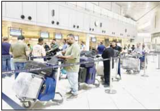
Passengers line up at Kuwait Airport check-in desks, all set for their summer getaway.

In a related development, Kuwait International Airport witnessed a busy flow of passengers, with thousands of expatriate workers departing on the first day of implementing the decision amid streamlined procedures characterized by flexibility and smoothness.