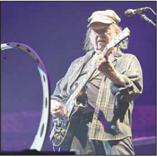
Neil Young performs on the Pyramid Stage during the Glastonbury Festival.