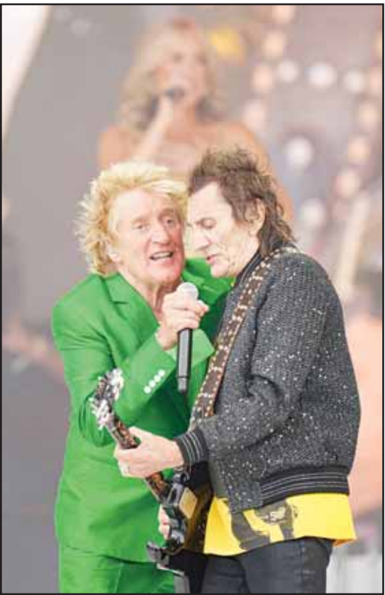
Rod Stewart, (left), is joined on stage by Ronnie Wood during the Glastonbury Festival.

of pro-Palestinian comments and criticism of the government. But it was the act that preceded them, Bob Vylan, that caused a furor when a member of the duo led chants of “death to the IDF,” the Israel Defense Forces.