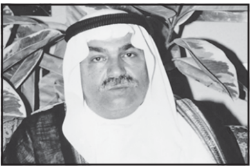
Dr. Bader Al-Yaqoub

KUWAIT CITY, July 1: After a long and distinguished career in politics and education, former Minister of Information Dr. Bader Al-Yaqoub has passed away, reports Al-Seyassah daily. He was regarded as one of the most prominent figures who left a notable impact on the legal and educational fields in recent years. Born in Kuwait in 1946, Dr. Al-Yaqoub served as a professor of law at the Faculty of Law in Kuwait University, and was the Editor-in-Chief of the Gulf and Arabian Peninsula Studies newspaper. He earned his PhD in