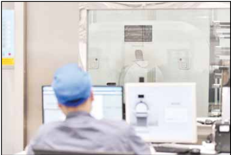
A worker checks a CT machine at Neusoft Medical in Shenyang, northeast China's Liaoning Province, May 22, 2024.

HANGZHOU, July 1, In a landmark development for medical technology, Chinese researchers have unveiled an artificial intelligence (AI) system capable of detecting early-stage stomach cancer through standard CT scans, a breakthrough that could transform cancer detection worldwide. The breakthrough comes as Chinese scientists and tech firms push to take a global lead in AI-powered healthcare, with far-reaching implications for millions at risk of the deadly disease. The GRAPE model, developed through a collaboration of Zhejiang Cancer Hospital and Alibaba's DAMO Academy, represents a significant leap forward in early cancer detection. Published last week in the journal Nature Medicine, the study demonstrates how AI can identify stomach tumors from non-contrast CT imaging, a method previously considered relatively ineffective for gastric cancer screening.