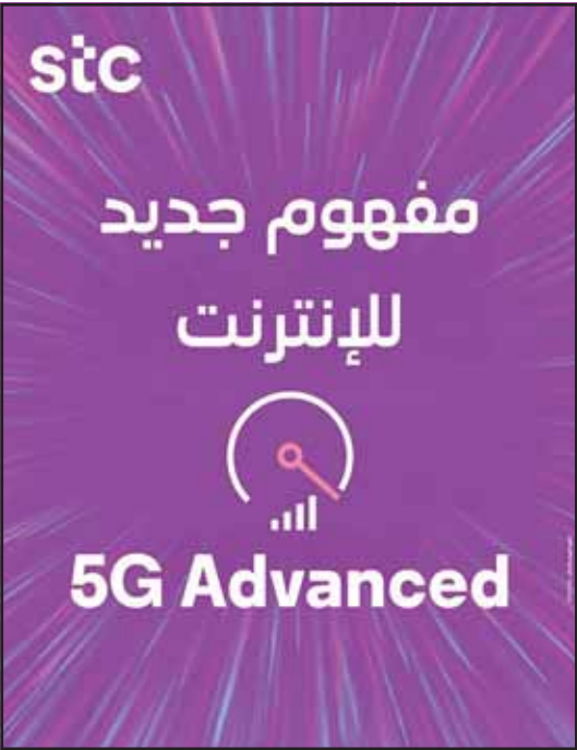
More precise connectivity, higher speeds, and more intelligent network capabilities.

made pivotal efforts to develop and strengthen our network capabilities, in addition to our pioneering position in fostering an environment of innovation. Additionally, we have focused on developing our infrastructure to empower the use cases of both businesses and individuals alike.” Aldharab concluded, “We consistently explore innovative methods to drive innovation and advance the solutions offered to our customers to enable digital transformation. Today, we are reinforcing this approach by launching our 5G Advanced network, which positions Kuwait on the global map in delivering high-speed 5G connectivity and innovative ICT solutions that serve various sectors.” stc was a pioneer when it came to launching its 5G services in Kuwait, a milestone that was made possible through the Company’s early investments in building a robust and scalable network infrastructure. This forward-looking approach enabled stc to seamlessly integrate 5G capabilities across its operations and offerings, laying the foundation for more advanced technologies such as 5G Advanced. To find out more about stc’s events, promotions, and sponsorships, follow stc’s official social media platforms, visit one of stc’s branches, download mystc mobile application, visit www.stc.com.kw or contact the customer service center by dialing 102 for around the clock assistance.