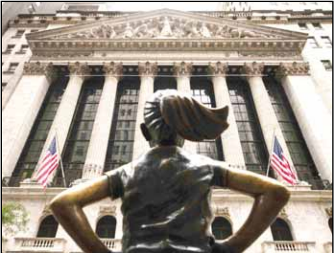
The 'Fearless Girl' statue stands in front of the New York Stock Exchange, Wednesday, June 18, 2025, in New York.

ing environment for startups, contributing to strengthening the business sector and providing investors with new opportunities based on high standards of transparency. Based on a comprehensive study, CMA developed the regulations and rules for this emerging companies market to serve as both a supportive platform for startups and an innovative investment option for investors, in line with international best practices. As part of enhancing the regulatory environment for companies listed on both the Premium and Main Official Markets, CMA stresses the importance of continuously updating regulations to ensure companies consistently meet listing requirements and protect investors from those that fail to fulfill ongoing obligations. CMA also highlights the need to maintain sufficient liquidity by setting minimum thresholds for the percentage of free float shares and the market value of those shares.