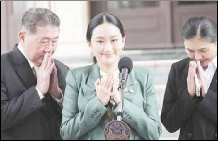
Thailand's Prime Minister Paetongtarn Shinawatra, center, speaks to media at the Government House in Bangkok, Thailand on July 1.

culture minister in addition to prime minister in the new Cabinet, though it’s still unclear if she can take the oath