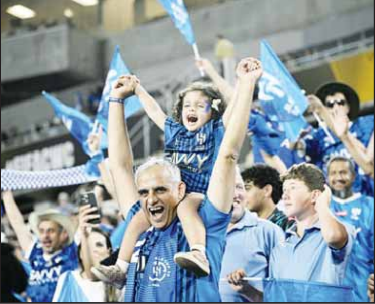
Fans cheer before the Club World Cup round of 16 soccer match between Manchester City and Al Hilal in Orlando, Fla.

gation measures could include 20-minute halftime breaks instead of 15 to help lower players’ core temperatures, and cooling breaks in play every 15 minutes. Currently, breaks are taken in the 30th minute of each half.