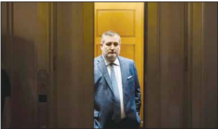
US Sen Ted Cruz, R-Texas, stands in an elevator as Republicans begin a final push to advance President Donald Trump’s tax breaks and spending cuts package, at the Capitol in Washington on June 30.

But that effort was abandoned when Sen. Marsha Blackburn, a Tennessee Republican, teamed up with Democratic Sen. Maria Cantwell of Washington on Monday night to introduce an amendment to strike the entire proposal. Voting on the amendment happened after 4 a.m. Wednesday as part of an overnight session as Republican leaders sought to secure support for the tax cut bill while fending off other proposed amendments, mostly from Democrats trying to defeat the package. Also: DALLAS: Former Texas congressman Colin Allred launched another run for the US Senate on Tuesday after the Democrat’s challenge against Republican Sen. Ted Cruz last year broke records for spending but did not deliver his party the breakthrough it has sought for decades in the state. This time, Allred is seeking the seat of Republican Sen. John Cornyn, who is facing a primary challenge from Texas Attorney General Ken Paxton in what is likely to be one of the GOP’s most contentious contests in 2026.