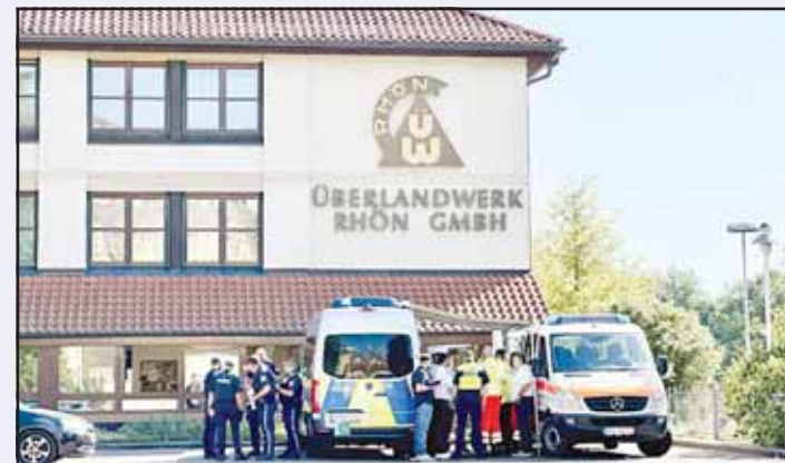
Police and emergency services stand on the premises of regional grid operator Überlandwerk Rhön, after a man armed with a “sharp object” attacked people at a company in Germany, killing at least one, police said, in Mellrichstadt, Germany on July 1.

Both sides in the more than three-year war following Russia’s February 2022 invasion of its neighbor have raced to improve drone technology