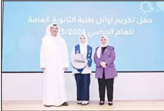
Celebrating a high-achieving student.

Attended by company and MoE officials, honorees’ parents