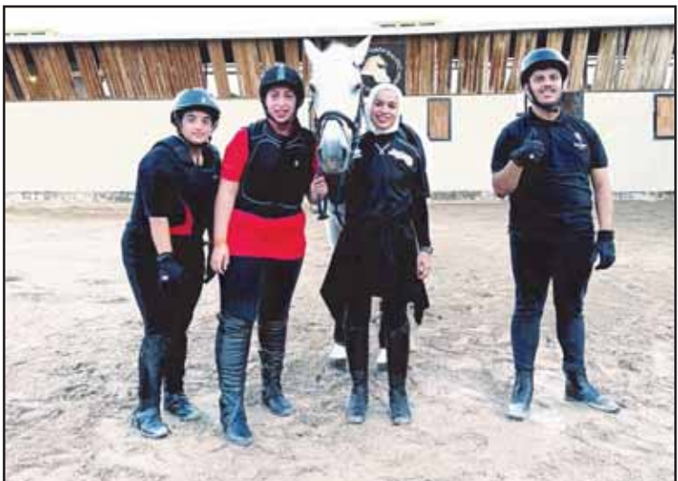
The Kuwaiti equestrian delegation.

Al-Zawawi highlighted Kuwait's progress in building a strong foundation in equestrian sports, noting the international and