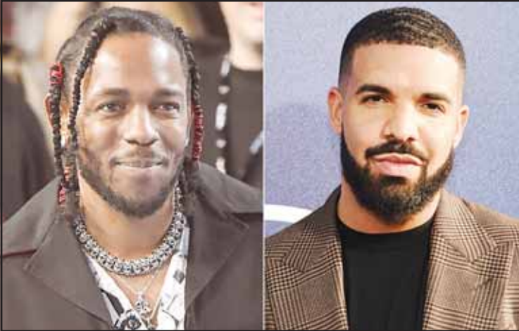
In this combination of images, rapper Kendrick Lamar appears at the MTV Video Music Awards on Aug. 27, 2017, in Inglewood, Calif., (left), and Canadian rapper Drake appears at the premiere of the series ‘Euphoria,’ in Los Angeles on June 4, 2019.

“Not Like Us” also makes insinuations about Drake’s private life, including “I hear you like ‘em young” - implications that he rejects.