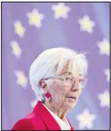
ECB President Christine Lagarde attends a press conference in Frankfurt, Germany on June 5, 2025. (AP)

FRANKFURT, Germany, July 1, (AP): The head of the European Central Bank said inflation has become more unpredictable due to shocks like the COVID-19 pandemic and Russia’s invasion of Ukraine - and that policymakers need to take the possibility of such extreme scenarios into account and communicate them to the public as well. “The world ahead is more uncertain, and that uncertainty is likely to make inflation more volatile,” ECB President Christine Lagarde said Monday in a speech opening the central bank’s annual conference in Sintra, Portugal. “It’s pretty basic but that’s the reality.” One reason, she said, was that increasingly regular supply disruptions were leading companies to change their prices more frequently, a habit that goes beyond the recent burst of inflation in the U.S. and Europe and “reflects a structural shift in how firms operate under conditions of permanently higher uncertainty.” The bank’s assessment of the economy needs to rely on taking extreme possible scenarios into account as well