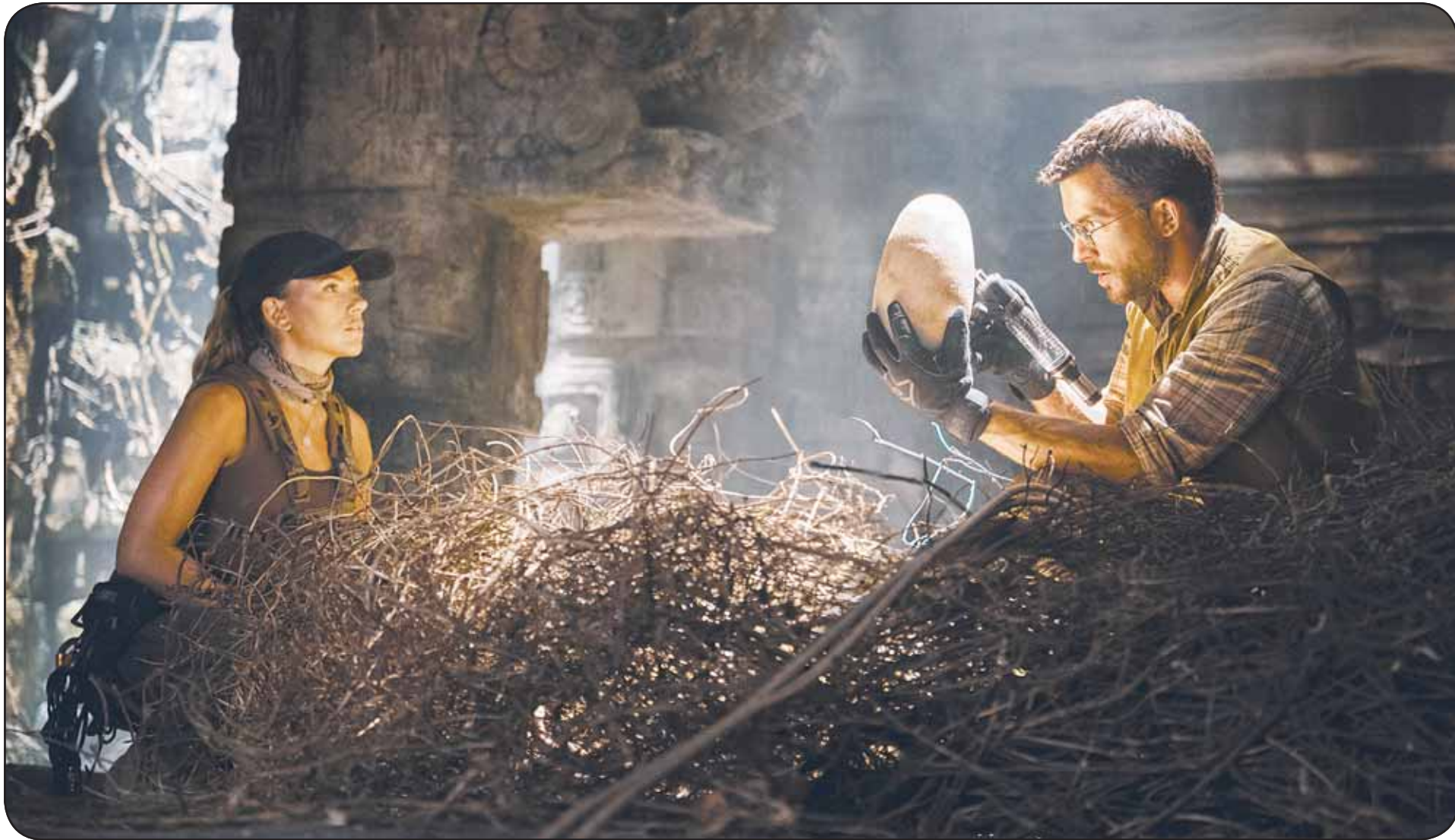
This image released by Universal Pictures and Amblin Entertainment shows Scarlett Johansson, (left), and Jonathan Bailey in a scene from ‘Jurassic World: Rebirth.’