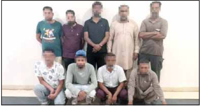
Photo shows arrested suspects linked to the Europe-bound visa forgery network.

The Ministry reaffirmed its commitment to upholding the country's security and enforcing the law, warning that it will not tolerate such criminal activities, as well as urged the public to adhere to all laws and regulations.