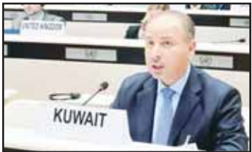
Ambassador Nasser Al-Hayen, Permanent Representative of the State of Kuwait to the United Nations and other international organizations in Geneva.

GENEVA, July 1, (KUNA): The Gulf Cooperation Council (GCC) member states on Monday underscored the need for a gradual and balanced transition in addressing climate change, particularly in the phase-out of fossil fuels from national economies. They emphasized that such a transition must preserve development gains and enable countries to implement climate policies tailored to their national circumstances and priorities in accordance with the principle of common but differentiated responsibilities and respective capabilities. This came in a statement delivered by