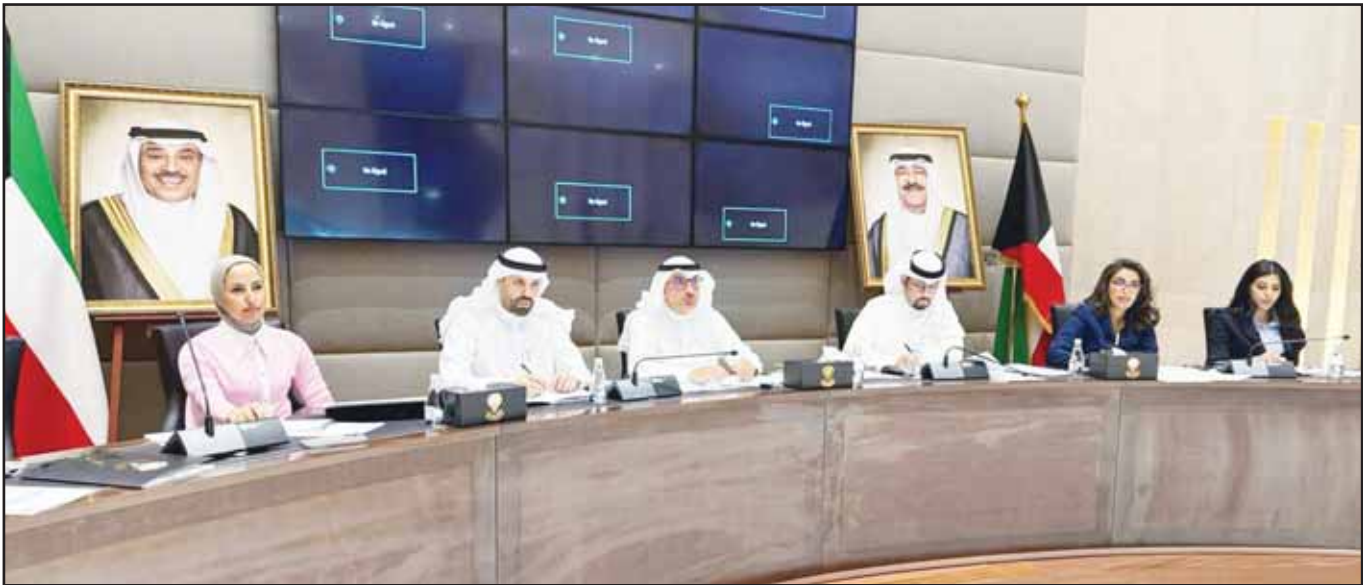
Part of the virtual meeting of senior officials from the foreign ministries of the Gulf Cooperation Council countries, chaired by the State of Kuwait.

Bloc eyes stronger security and crisis readiness