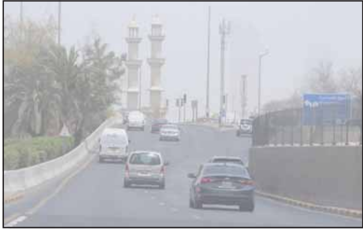
Motorists drive cautiously through dusty conditions and steady winds on a Kuwait road Tuesday, as visibility decreases in affected areas.

KUWAIT CITY, July 1, (KUNA): The country will remain under the influence of strong, dusty winds through Saturday, with visibility in some areas dropping to less than 1,000 meters, particularly in open regions, according to Dhirar Al-Ali, Director of the Meteorological Department.