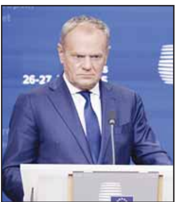
Poland’s Prime Minister Donald Tusk addresses a media conference at an EU summit in Brussels on June 26.

Tusk said that “the German side refuses to allow migrants to enter its territory. ... The change in practice introduced tensions and a sense of asymmetry,” according to Polish state broadcaster TVP. He said he had discussed the issue