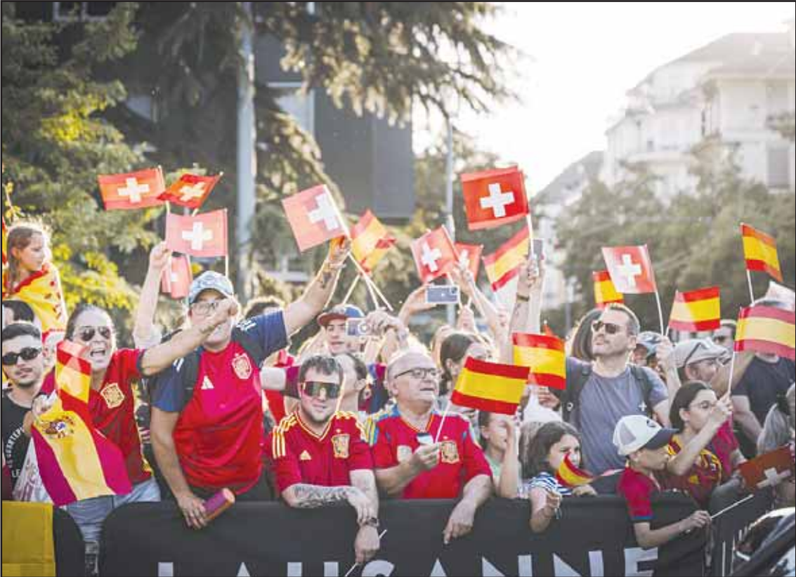
Fans react to the arrival of Spain’s women’s national football team at their hotel, the Royal Savoy in Lausanne, Switzerland, on the sidelines of the UEFA Women’s Euro 2025.