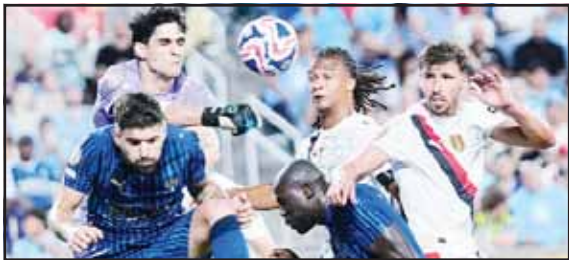
Al Hilal's goalkeeper Yassine Bounou punches the ball clear of the goal during the Club World Cup round of 16 soccer match between Manchester City and Al Hilal in Orlando, Fla.