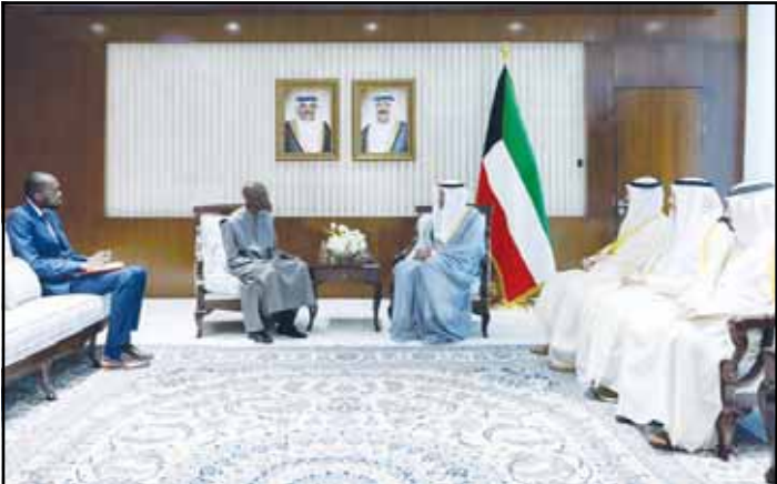
Kuwait Foreign Minister Abdullah Al-Yahya receives credentials of Ambassador of Senegal to Kuwait.