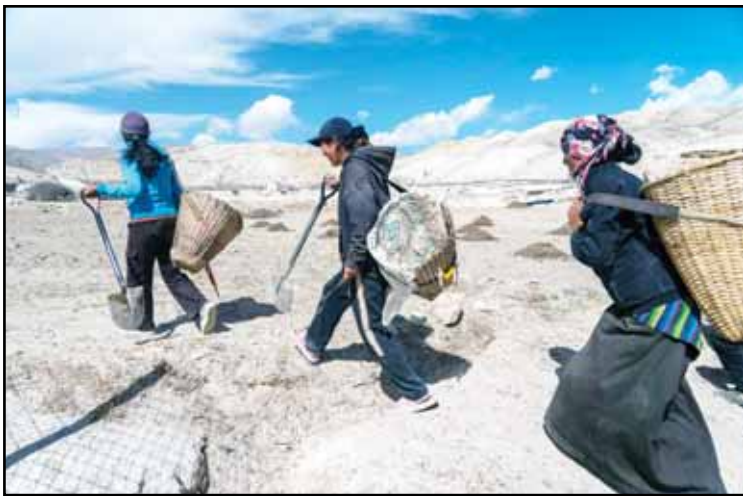
Villagers walk towards a field to plant apple trees in the newly relocated settlement of the abandoned Samjung village in the Mustang region, 462 kilometers (288 miles) west of Kathmandu, Nepal, Friday, April 18, 2025. (AP)

SAMJUNG, Nepal, July 1, (AP): The Himalayan village of Samjung did not die in a day. Perched in a wind-carved valley in Nepal's Upper Mustang, more than 13,000 feet (3,962 meters) above sea level, the Buddhist village lived by slow, deliberate rhythms - herding yaks and sheep and harvesting barley under sheer ochre cliffs honeycombed with "sky caves" - 2,000-year-old chambers used for ancestral burials, meditation and shelter. Then the water dried up. Snow-capped mountains turned brown and barren as, year after year, snowfall declined. Springs and canals vanished and when it did rain, the water came all at once, flooding fields and melting away the mud homes. Families left one by one, leaving the skeletal remains of a community transformed by climate change: crumbling mud homes, cracked terraces and unkempt shrines. The Hindu Kush and Himalayan mountain regions - stretching from Afghanistan to Myanmar - hold more ice than anywhere else outside the Arctic and Antarctic. Their glaciers feed major rivers that support 240 million people in the mountains - and 1.65 billion more downstream. Such high-altitude areas are warming faster than lowlands. Glaciers are retreating and permafrost areas are thawing as snowfall becomes scarcer and more erratic, according to the Kathmandu-based International Centre for Integrated Mountain Development or ICMOD. Kunga Gurung is among many in the