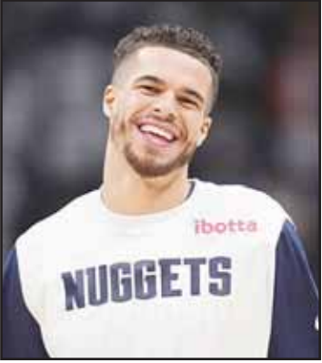
In this file photo, Denver Nuggets forward Michael Porter Jr. (1) in the first half of Game 6 in the Western Conference semifinals of the NBA basketball playoffs in Denver.

Finney-Smith averaged 8.7 points and was a 41% shooter from 3-point