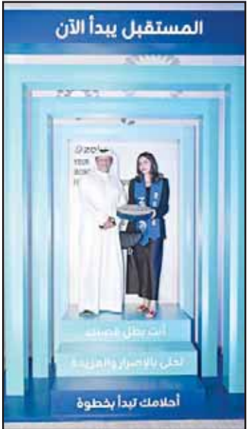
Zain annually highlights academic excellence.

He added: “We meet today at a time when we are witnessing the results of continuous efforts to advance the educational system in our nation. This year’s exceptional performance