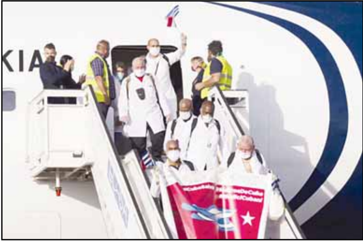
Cuban doctors arrive at the Jose Marti International Airport in Havana, Cuba on June 8, 2020, after traveling to Italy to help with the COVID-19 emergency response.

had protected them from deportation. The administration also has announced visa restrictions on Cuban and foreign government officials involved in Cuba’s medical missions, which Secretary of State Marco Rubio has called “forced labor.” In an interview with The Associated Press this month, Cuban Deputy Foreign Minister Carlos Fernandez de Cossio accused the United States of trying to discredit the medical missions and criticized reversal of policy welcoming Cubans to the US.