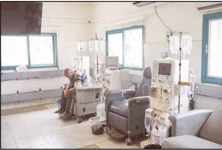
A patient sits in the dialysis unit at Shifa Hospital in Gaza City on Tuesday, July 1, after the facility suspended its services due to fuel shortages needed to power its generators.

West Bank documenting 844 attacks between October 2023 and mid-June 2025, which resulted in 31 deaths and 168 injuries. Speaking online from (Jerusalem) during a press conference in Geneva, Head of WHO's Office for Occupied Palestinian Territory Rick Peeperkorn warned about the worsening health crisis in the West Bank driven by intensifying military Israeli occupation operations, rising settler violence, repeated attacks on healthcare and severe access restrictions that continue to obstruct the delivery of vital services. Peeperkorn detailed that 65 health facilities had been targeted 24 mobile clinics and 567 ambulances across the West Bank. He noted that 67 percent of these attacks occurred in areas such as (Jenin) and (Tulkarem) and involved raids on ambulances, detentions of patients and health personnel blocked access to facilities and the use