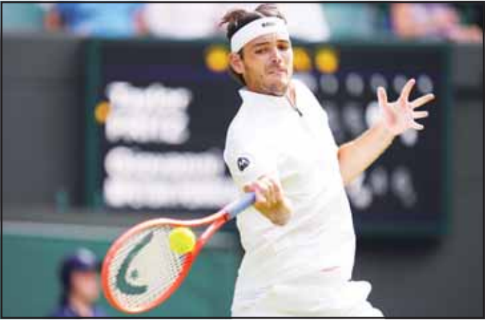
Taylor Fritz of the U.S. returns the ball to Giovanni Mpetshi Perricard of France during their first round men’s singles match at the Wimbledon Tennis Championships in London.

Marketa Vondrousova of the Czech Republic - whose title in 2023 made her the first unseeded woman to leave the All England Club with the singles trophy - and there were moments early Tuesday that it appeared it might happen again this year to the 17th-seeded Krejcikova, another Czech player and the French Open champion in 2021.