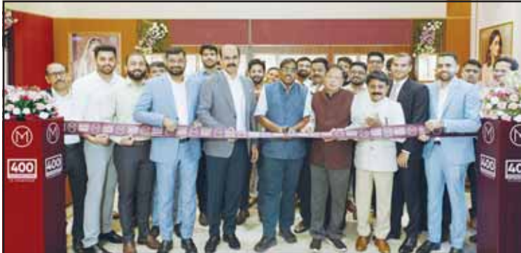
400th showroom inauguration.

“We remain committed to redefining the jewellery shopping experience in a responsible and ethical manner while ensuring the utmost care and protection for our customers and their interests with every purchase. Our expansion will create additional 3,500 direct employment opportunities, in addition to supporting the large jewellery manufacturing ecosystem. Our operations are built on a foundation of complete transparency and strict com-