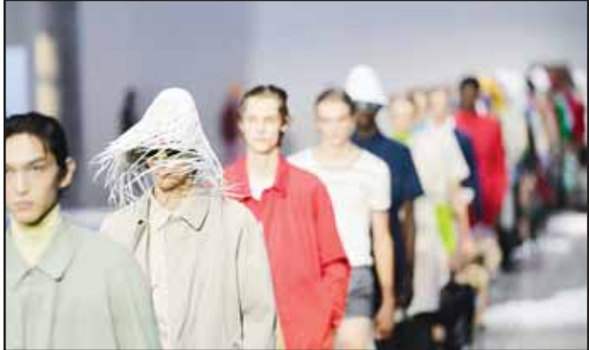
Models wear creations as part of the men's Prada Spring-Summer 2026 collection, in Milan, Italy, June 22.