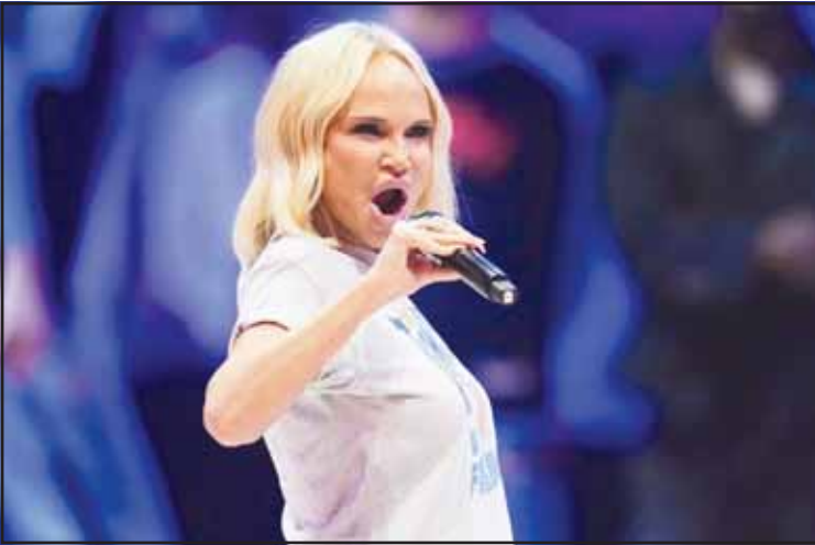
Kristin Chenoweth sings the national anthem before Game 7 of the NBA Finals basketball series between the Indiana Pacers and the Oklahoma City Thunder Sunday, June 22, in Oklahoma City.

"I never miss a game unless I'm on stage," Chenoweth said. "I was a cheerleader in high school in Broken Arrow, Oklahoma, and I loved football, but my favorite was basketball. I like how much of a team player you've got to be. ... And this is my team."