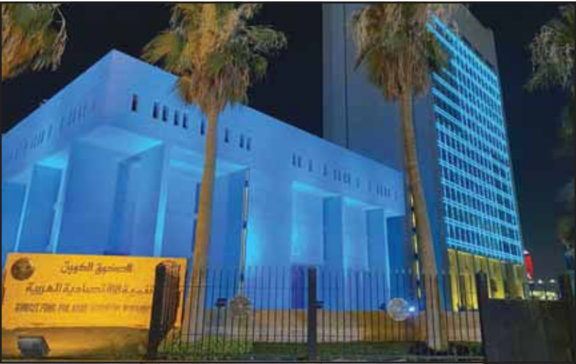
KFAED photo Kuwait Fund for Arab Economic Development illuminated in blue.

It warned that failure to update their information will result in a fine of KD 100 per person, in accordance with Article 33 of Law No. 32/1982.