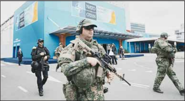
Security patrol around the perimeter of the venue ahead of the upcoming NATO summit in The Hague, Netherlands on June 23.