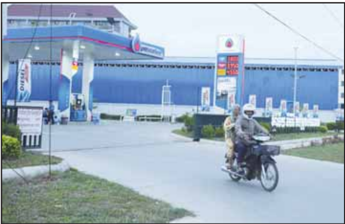
A couple rides on a motorcycle after filling gasoline at a PTT, (Petroleum Authority of Thailand), outside Phnom Penh, Cambodia, Monday, June 23, 2025.

The average monthly imports of gasoline and other fuel to Cambodia from Thailand is 85,426 metric tons (94,166 tons), which is 30% of all na-