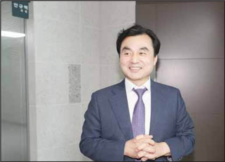
Ahn Gyu-back, South Korean defense minister nominee, leaves his office at the National Assembly in Seoul, South Korea on June 23.

While Ahn will face a legislative hearing, the process is likely to be a formality, since the Democrats hold a comfortable majority in the National Assembly and legislative consent isn’t required for Lee to appoint him. Among Cabinet appointments, Lee only needs legislative consent for prime minister,