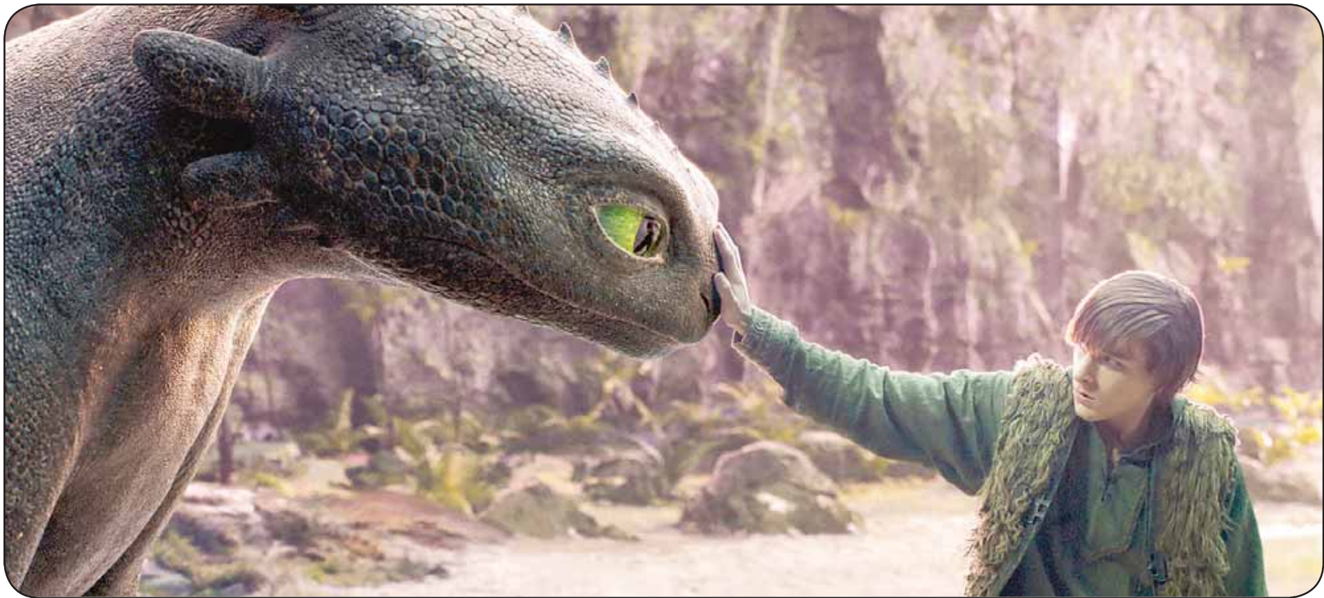
This image released by Universal Pictures shows Mason Thames in a scene from 'How to Train Your Dragon.' (AP)