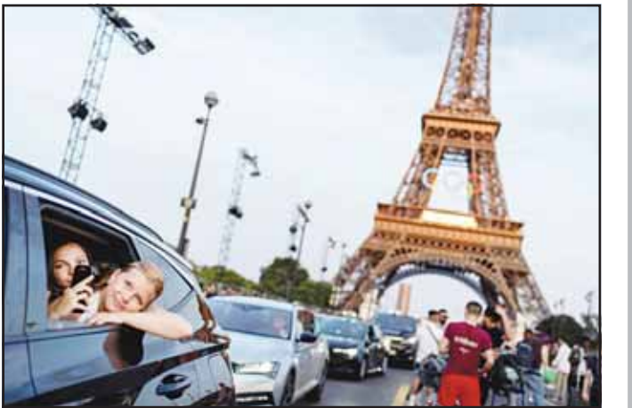
In this file photo, passengers in the back of a taxi film themselves as they leave the Eiffel Tower, decorated with the Olympic rings ahead of the 2024 Summer Olympics, in Paris.

“The report does not include, due to unavailable data, any analysis of the positive or negative effects of the Games on economic activity or tax revenues, nor an assessment of tax expenditures related to their organization,” the Cour said in a summary statement. “On this last point, the tax authorities informed the Court that no overall estimate is currently planned. This position is unsatisfactory, and the Court calls on the State to begin this evaluation without delay.”