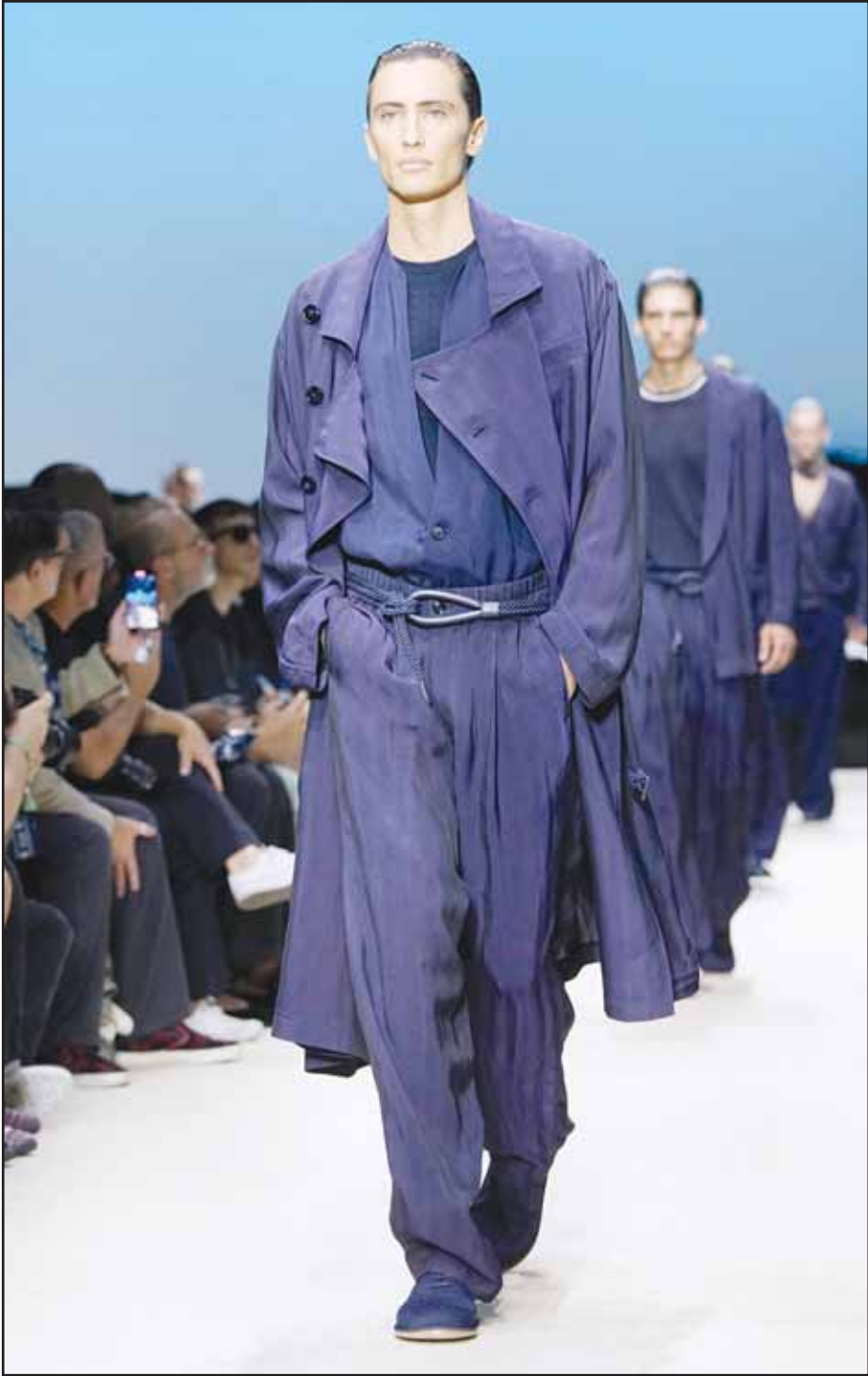
Models wear creations as part of the men's Giorgio Armani Spring-Summer 2026 collection, that was presented in Milan, Italy, Monday, June 23.