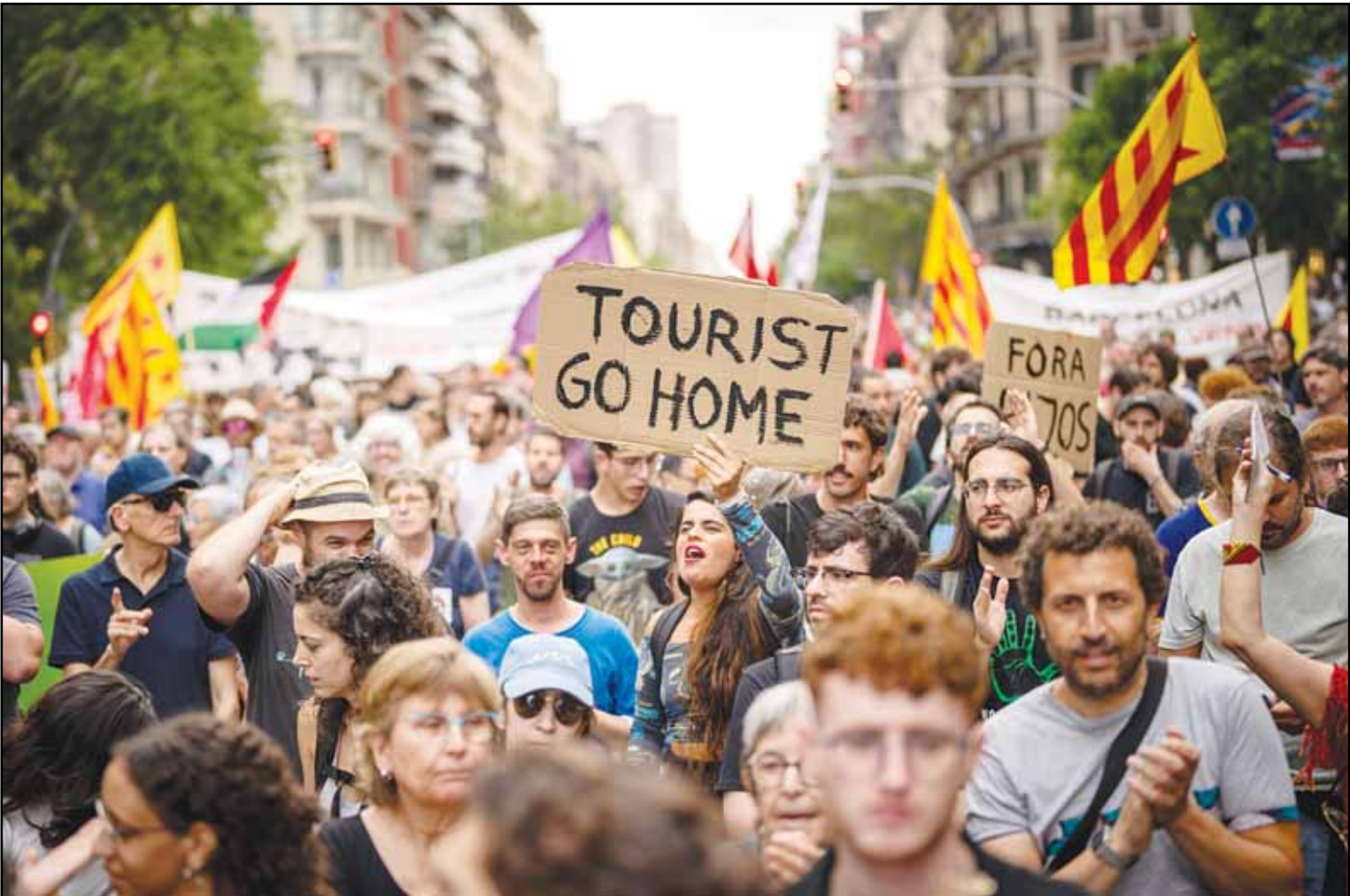
Demonstrators march shouting slogans against the Formula 1 Barcelona Fan Festival in downtown Barcelona, Spain, Wednesday, June 19, 2024, during residents protest against mass tourism.