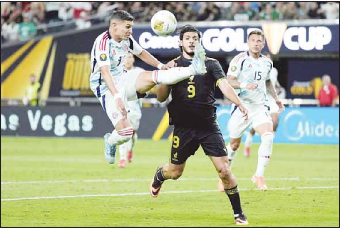
Costa Rica's Manfred Ugalde kicks the ball away from Mexico's Raul Jimenez during a CONCACAF Gold Cup soccer match in Las Vegas.