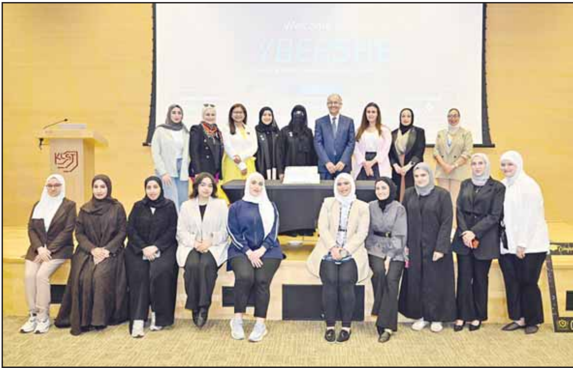
Group photo of program participants.

Zain's support reflects its strong commitment to advancing women's