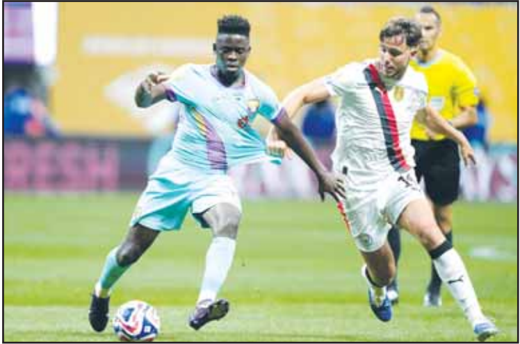
Al Ain's Abdoul Karim Traore, left, and Manchester City's Nico Gonzalez fight for the ball during the Club World Cup Group G soccer match between Manchester City and Al Ain in Atlanta.

also because of the [early] kick-off time, and the tempo was lower," Juventus manager Igor Tudor said afterwards. "They had prepared for us as well. We scored early, which helped us. But in football, you never know, you always have to stay alert."