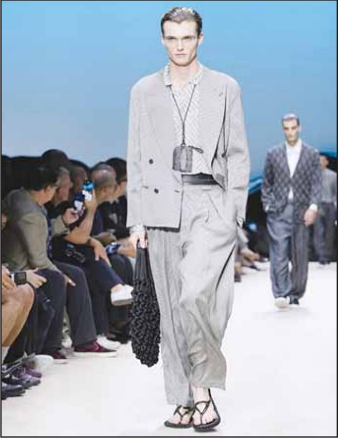
A model wears a creation as part of the men's Giorgio Armani Spring-Summer 2026 collection.