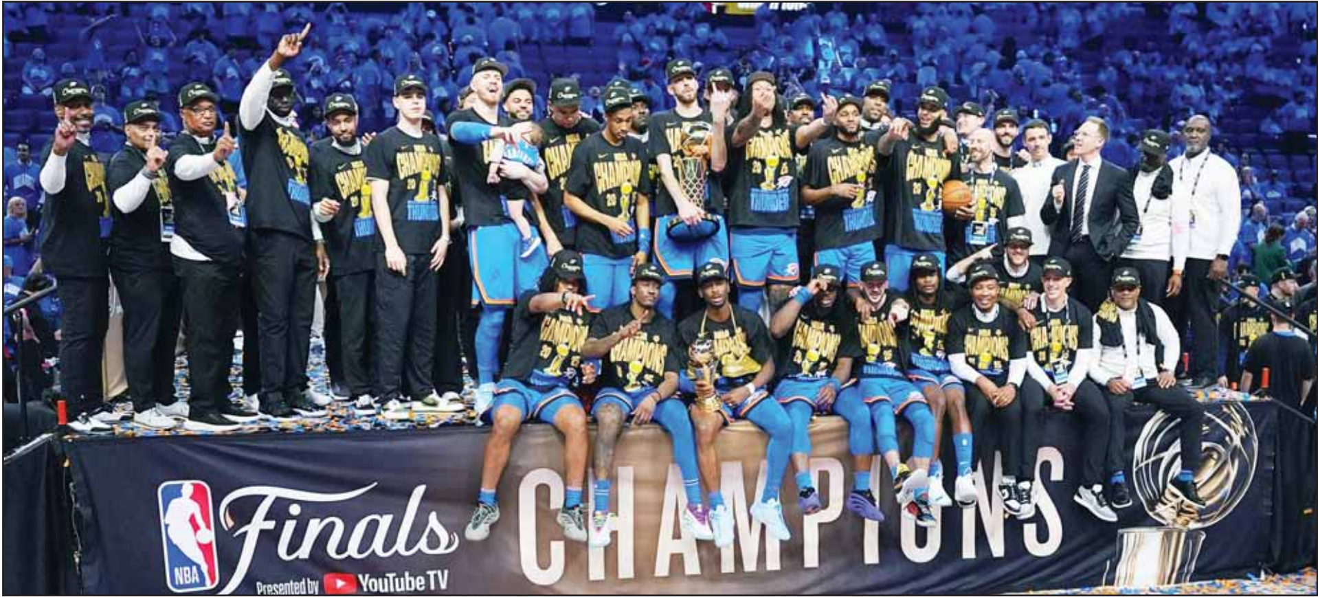
Oklahoma City Thunder players celebrate after winning the NBA basketball championship with a Game 7 victory against the Indiana Pacers in Oklahoma City.

It's the second championship for the franchise. The Seattle SuperSonics won the NBA title in 1979; the team was moved to Oklahoma City in 2008.