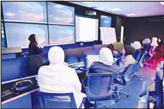
The partnership falls under Zain's Women in Tech initiative.

roles in technology and cybersecurity, and aligns with its broader efforts to support the innovation ecosystem in Kuwait. These efforts include its recent support of the Kuwait CyberChamps Competition for school students, its long-standing partnership with CODED Academy for programming education, and other key initiatives designed to prepare a