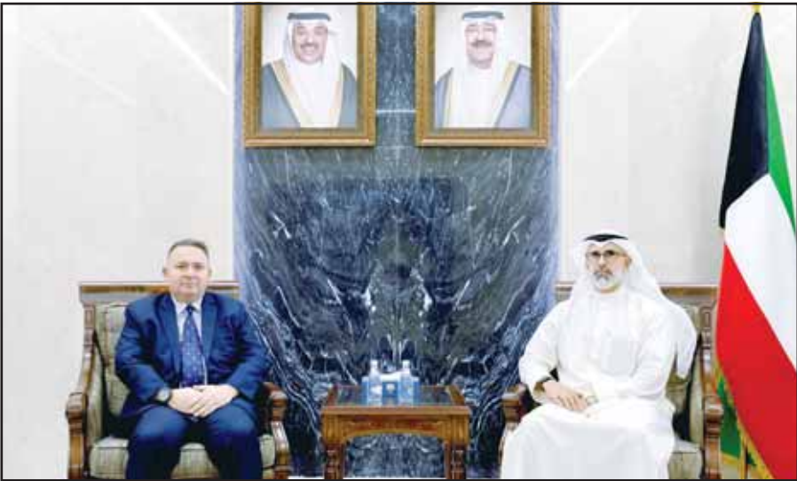
Deputy Foreign Minister with UK's Senior Defence Adviser to the Middle East.