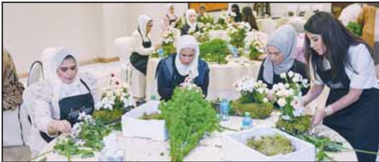
Part of the workshop.

For its part, Angle Flowers expressed pride in collaborating with ABK for this initiative, highlighting that the partnership reflects its commitment to community engagement and empowering women to