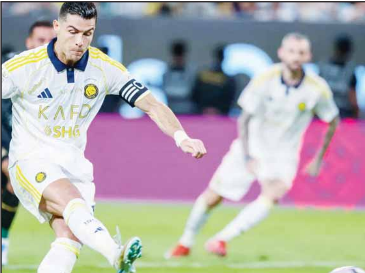
In this file photo, Cristiano Ronaldo shoots the ball during a league game.

While the financial terms of the new contract have not been officially disclosed, sources suggest that it is likely to mirror his current deal, reportedly valued at euro 200 million per year - placing him among the highest-paid athletes globally.