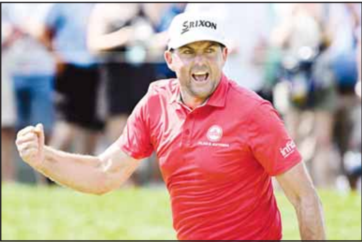
Keegan Bradley reacts to making birdie putt to a tie for the lead on the ninth hole during the final round of the Travelers Championship golf tournament at TPC River Highlands in Cromwell, Conn.

Lee, ranked 24th, took home $1.8 million of the record $12 million purse, which was up from $10.4 million a year ago and matched the U.S. Women’s Open for the most prize money. She also got $1.8 million for her four-stroke win in the 2022 U.S. Women’s Open.