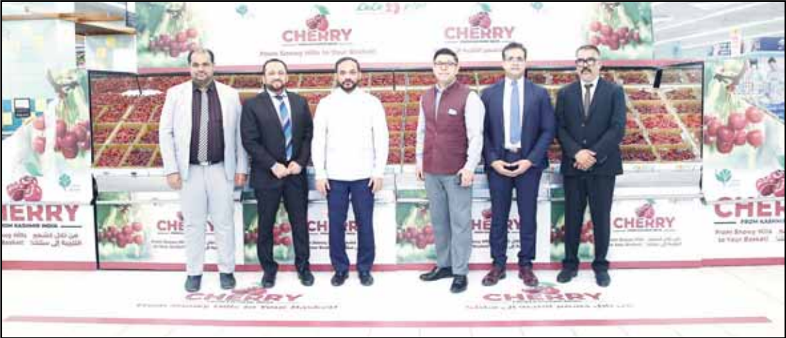
Exclusive launch ceremony at Lulu Hypermarket, Al Rai.