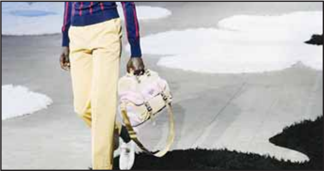
A model presents creation as part of the men's Prada Spring-Summer 2026 collection in Milan, Italy, June 22.