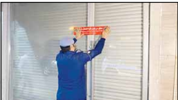
The establishment is sealed.