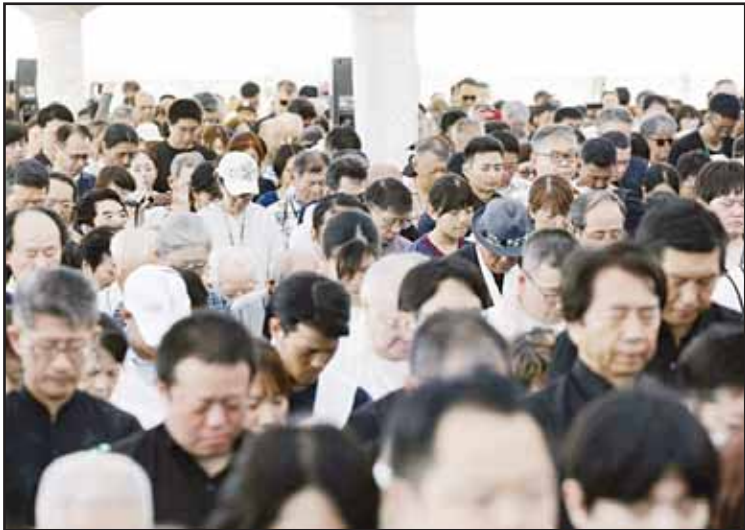
Participants offer a silent prayer during a memorial ceremony at the Peace Memorial Park in Itohan, Okinawa, southern Japan on June 23, as Japan marked the 80th anniversary of the end of the Battle of Okinawa.

Gov Denny Tamaki , noting the escalating global conflicts and nuclear threats, made a resolve to contribute to