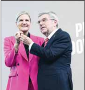
IOC President Thomas Bach, right, and President-elect Kirsty Coventry pose during the handover ceremony of the IOC Presidency at Olympic House in Lausanne, Switzerland.

The 71-year-old German lawyer, an Olympic champion in team fencing in 1976, leaves after the maximum 12 years in an office he said was now in