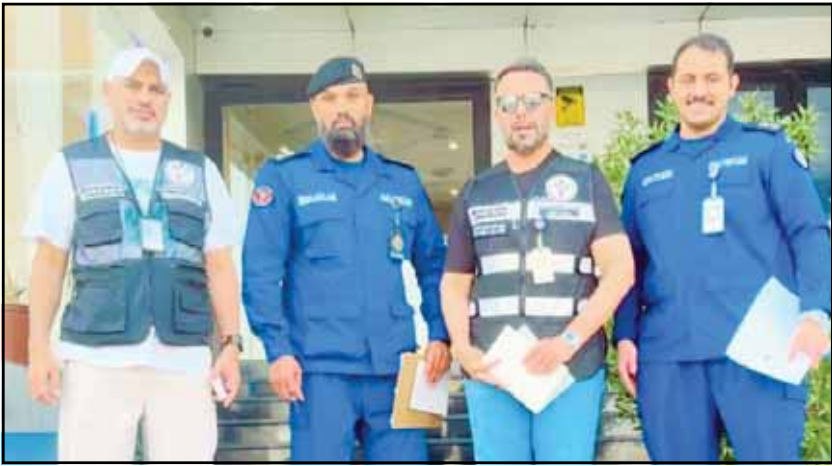
Representatives of various authorities who conducted the raids.