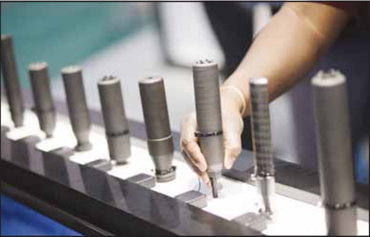
Gun silencers are on display at the Sig Sauer booth at the Shooting, Hunting and Outdoor Trade Show in Las Vegas on Jan 19, 2016.

WASHINGTON, June 23, The massive tax and spending cuts package that President Donald Trump wants on his desk by July 4 would loosen regulations on gun silencers and certain types of rifles and shotguns, advancing a long-time priority of the gun industry as Republican leaders in the House and Senate try to win enough votes to pass the bill. The guns provision was first requested in the House by Georgia Rep. Andrew Clyde, a Republican gun store owner who had initially opposed the larger tax package. The House bill would remove silencers - called "suppressors" by the gun industry - from a 1930s law that regulates firearms that are considered the most dangerous, eliminating a $200 tax while removing a layer of background checks. The Senate kept the provision on silencers in its version of the bill and expanded upon it, adding short-barreled, or sawed-off, rifles and shotguns. Republicans who have long supported the changes, along with the gun industry, say the tax infringes on Second Amendment rights. They say silencers are mostly used by hunters and target shooters for sport. "Burdensome regulations and unconstitutional taxes shouldn't stand in the way of protecting American gun owners' hearing," said Clyde, who owns two gun stores in Georgia and often wears a pin shaped like an assault rifle on his suit lapel.