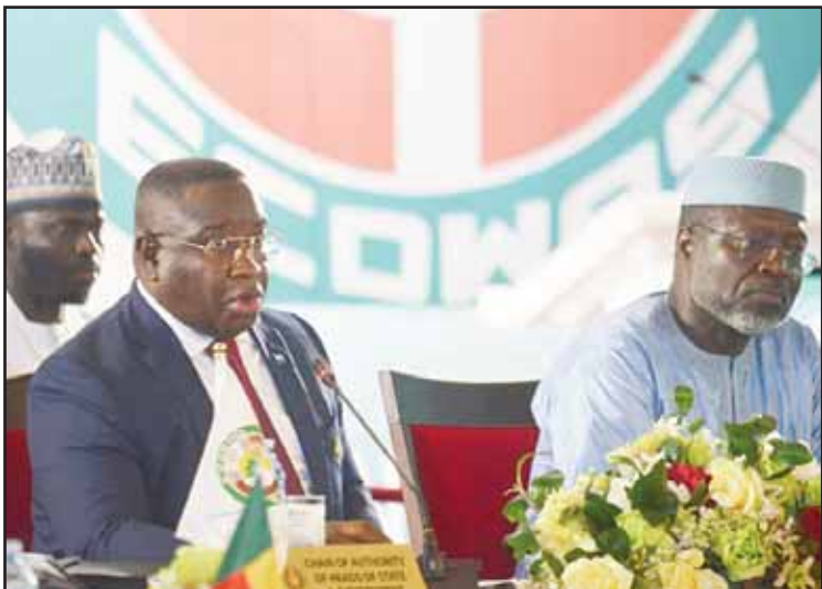
Sierra Leone President Julius Maada Bio, left, speaks during the ECOWAS meeting, in Abuja, Nigeria on June 22.

He was president when ECOWAS imposed severe sanctions on Niger