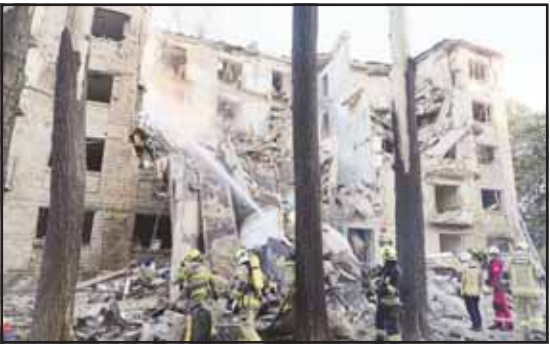
Firefighters work to extinguish a fire in an apartment building after Russian attack in Kyiv, Ukraine on June 23. (AP)

KYIV, Ukraine, June 23, (AP): Russian drones and missiles killed at least 14 civilians and injured several dozen others in Ukraine in overnight attacks, local officials said Monday, with nine deaths reported in the capital, Kyiv, where an apartment building partially collapsed. The attacks came as Ukraine's President Volodymyr Zelenskyy began a visit to the United Kingdom, where he met privately with King Charles III. Russia fired 352 drones and decoys overnight, as well as 11 ballistic missiles and five cruise missiles, Ukraine's air force said. Air defenses intercepted or jammed 339 drones and 15 missiles before they could reach their targets, a statement said. A Russian ballistic missile strike destroyed a high school later in the day in Ukraine's southern Odesa region, killing two staff, authorities said. No children were on the premises due to the summer vacation, said Zelenskyy, who described the strike as "absolutely insane." The strikes came nearly a week after a Russian attack killed 28 people in Kyiv, 23 of them in a residential building that collapsed after a direct missile hit. Russia has also hit civilian areas with long-range strikes in an apparent attempt to weaken Ukrainian morale. Russian forces have been trying to drive deeper into Ukraine as part of a summer push along the roughly 1,000-kilometer (620-mile) front line, though the Institute for the Study of War said progress has failed to make significant gains.