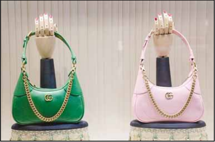
These are Gucci bags in the window of a Gucci store in Pittsburgh on Jan. 30, 2023.

national visitors, while second-place Spain received almost 94 million - nearly double its own population. Protests have erupted across Spain over the past two years. In Barcelona, the water gun has become a symbol of the city’s anti-tourism movement after marching protests have spritzed unsuspecting tourists while carrying signs saying: “One more tourist, one less resident!” The pressure on infrastructure has been particularly acute on Spain’s Canary and Balearic Islands, which have a combined population of less than 5 million people. Each archipelago saw upwards of 15 million visitors last year. Elsewhere in Europe, tourism overcrowding has vexed Italy’s most popular sites including Venice, Rome, Capri and Verona, where Shakespeare’s “Romeo and Juliet” was set. On the popular Amalfi Coast, ride-hailing app Uber offers private helicopter and boat rides in the summer to beat the crowds.