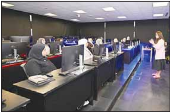
The initiative aims to bridge the gender gap in cybersecurity.