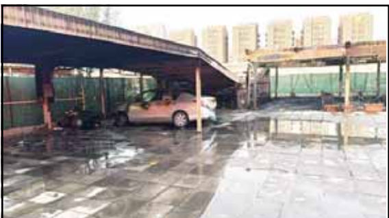
Destruction caused by the fire .

After receiving complaints from shareholders, the Ministry of Social Affairs immediately formed a specialized investigation committee. The committee reviewed documents, contracts, and administrative and financial records, and found that the manager had committed serious violations. Based on the committee's report, the case was referred to the Public Prosecution, which conducted investigations and subsequently referred the accused to court.