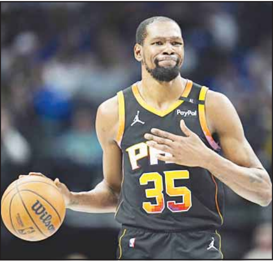
In this file photo, Phoenix Suns forward Kevin Durant gestures during the second half of an NBA basketball game in Dallas.

Houston will become his fifth franchise, joining the SuperSonics (who then became the Oklahoma City Thunder), Golden State, Brooklyn and Phoenix. Durant won his two titles with the Warriors in 2017 and 2018,