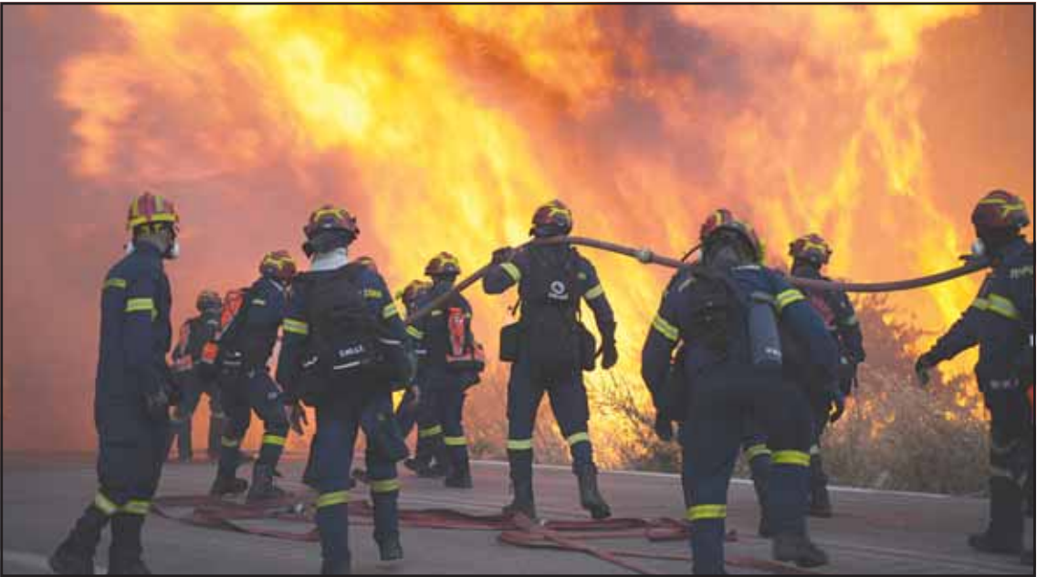
Firefighters battle a large wildfire burning in Karyes village, on the eastern Aegean island of Chios, Greece on June 22.

Greek authorities sent new evacuation notifications for two areas near the main town of the eastern Aegean island of Chios Monday morning, as firefighters struggled to control a major wildfire raging on the town's outskirts for a second day. The fire department said 190 firefighters were battling the blaze Monday. They were backed up by 35 vehicles, five helicopters and two water-dropping planes. Strong winds in the area since Sunday have hampered firefighting efforts.