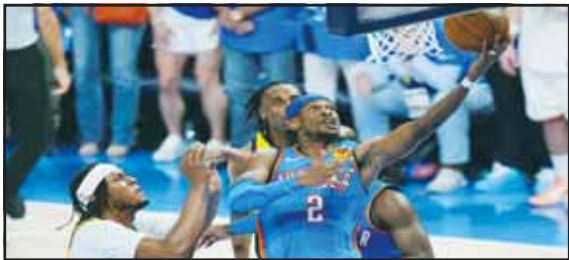
Oklahoma City Thunder guard Shai Gilgeous-Alexander (2) shoots against Indiana Pacers center Myles Turner (33) during the first half of Game 7 of the NBA Finals basketball series in Oklahoma City.