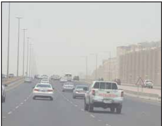
Vehicles cautiously navigate through a dense dust storm blanketing a Kuwait highway on Monday.

Scan QR code to visit the website: aljarallah.com