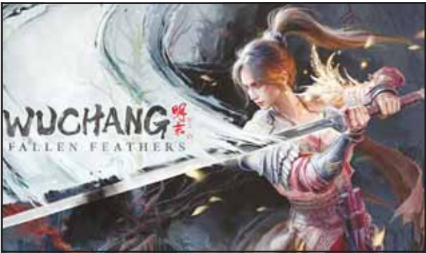
'WUCHANG: Fallen Feathers' poster

To authentically bring this world to life, the development team at Lingze Technology conducted six years of extensive field research, including 3D scanning at dozens of cultural and historical sites -- like the Anyue Stone Carvings and Taoping Village in the Aba Tibetan and Qiang Autonomous Prefecture. The result is a vivid recreation of these ancient landmarks within the game.