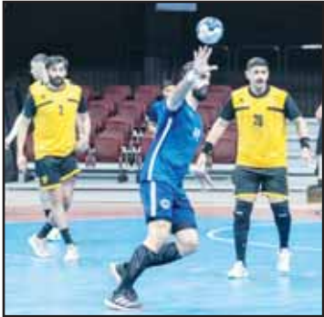
Players in action during the Handball Association Cup match in Kuwait.

Kuwait Club leads the all-time title count with 14 championships, includ-