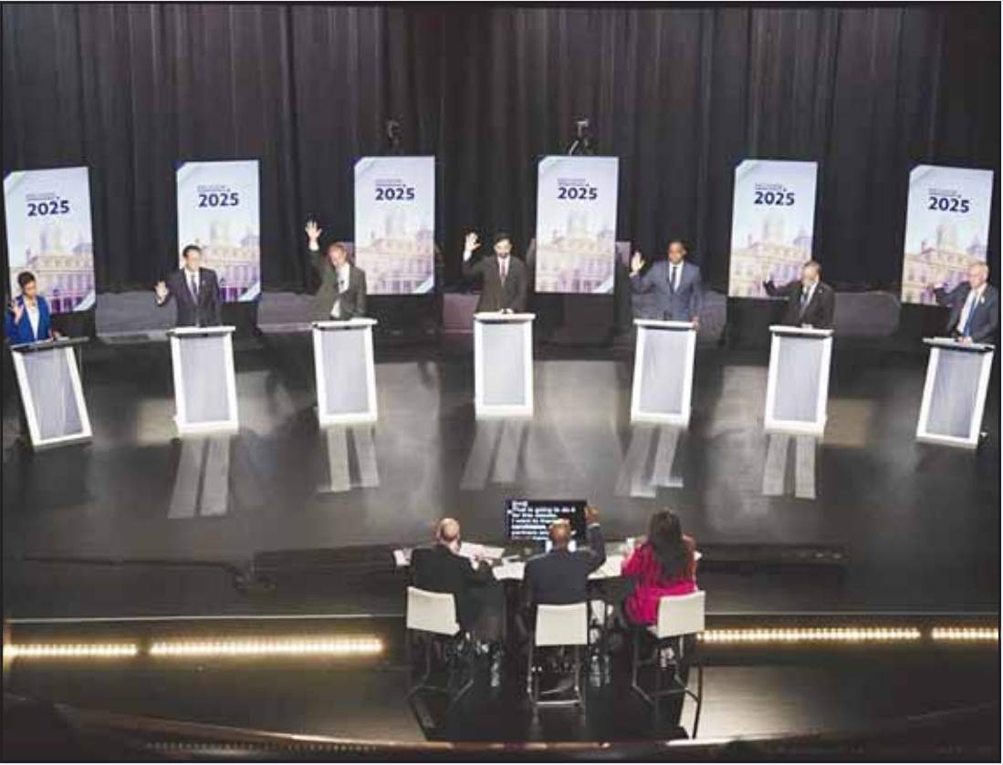
The New York City Democratic Mayoral Primary Debate at the John Jay College of Criminal Justice in the Gerald W. Lynch Theater on June 12, in New York City.