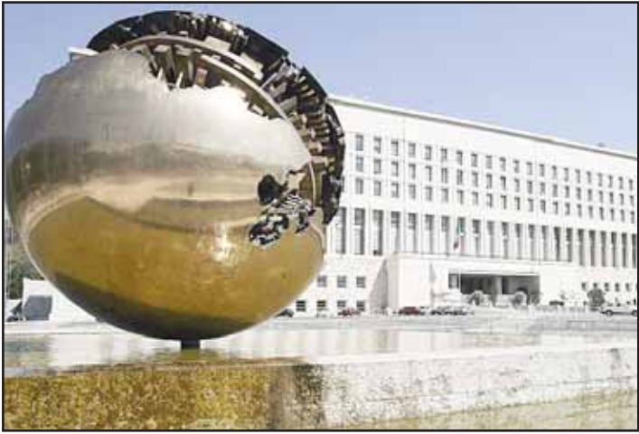
A spherical bronze sculpture by Italian artist Arnaldo Pomodoro, is seen outside the Italian Foreign Ministry Farnesina building, in Rome, Saturday, July 22, 2006.

1996. The UN sphere has refers to the coming of the new millennium, the UN said: “a smooth exterior womb erupted by complex interior forms,” and “a promise for the rebirth of a less troubled and destructive world.” Pomodoro said of it. Other spheres are located at museums around the world and outside the Italian foreign ministry, which has the original work that Pomodoro created in 1966 for the Montreal Expo that began his monumental sculpture project. Pomodoro was born in Montefeltro, Italy, on June 23, 1926. In addition to his spheres, he designed theatrical sets, land projects and machines. He had multiple retrospectives and taught at Stanford University, the University of California at Berkeley and Mills College, according to his biography on the foundation website.