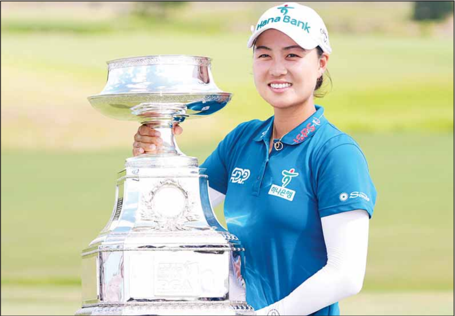
Minjee Lee holds the trophy after winning the Women’s PGA Championship golf tournament in Frisco, Texas.