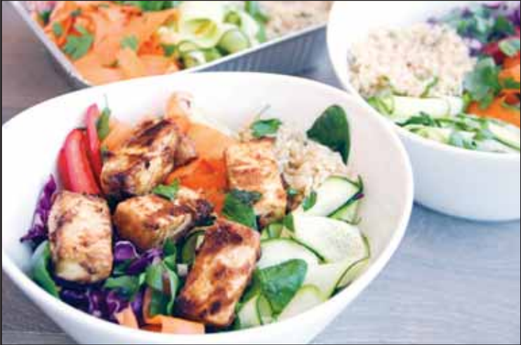
A Thai peanut, vegetable and tofu bowl is displayed for a photograph in Coronado, Calif., on April 29, 2017.

The World Health Organization recommends that healthy adults get