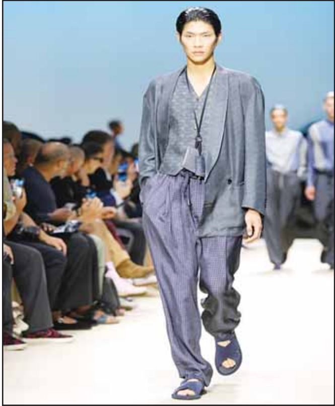
A model wears a creation as part of Giorgio Armani Spring-Summer 2026 collection.