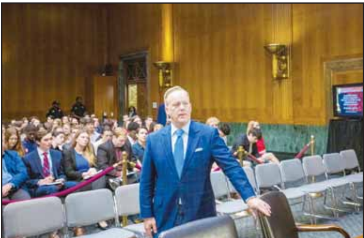
Sean Spicer, former White House press secretary, host of The Sean Spicer Show, arrives to testify at a Senate Committee on the Judiciary hearing on Capitol Hill on June 18, in Washington.

WASHINGTON, June 19, Nearly six months after Joe Biden left the White House, Senate Republicans are still scrutinizing his presidency, kicking off the first in what’s expected to be a series of congressional hearings this year on his mental fitness in office. Republicans on the Senate Judiciary Committee brought in three witnesses Wednesday - none of whom served in Biden’s administration - to scrutinize his time in office, arguing that Biden, his staff and the media must be held accountable. Democrats boycotted the hearing and criticized Republicans for “arm chair diagnosing” Biden when the committee could be looking into serious matters. Sen. John Cornyn of Texas, who co-chaired the hearing, said that they will aim to “shine a light on exactly what went on in the White House during Biden’s presidency.” “We simply cannot ignore what transpired because President Biden is no longer in office,” Cornyn said. A spokesperson for Biden declined to comment on the hearing. It was the first in what could be several hearings about Biden in the coming months. Over in the House, the Oversight Committee has subpoenaed several of Biden’s former staff members, along with his White House doctor, ordering him to testify at a June 27 hearing “as part of the investigation into the cover-up of President Joe Biden’s cognitive decline.”