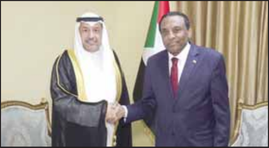
The Sudanese Prime Minister receives the Kuwaiti Ambassador. pointing out that these efforts stem from Kuwaiti values and firm principles.