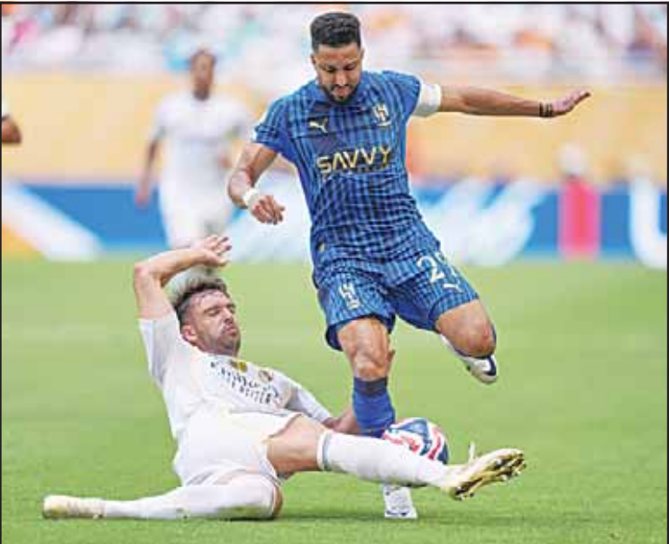
Real Madrid's Raúl Asencio slide tackles Al-Hilal's Salem Al-Dawsari during the Club World Cup Group H soccer match between Real Madrid and Al Hilal in Miami Gardens, Fla.

In Wednesday's late match, Randal Kolo Muani and Francisco Conceicao scored two goals each as Juventus romped to a 5-0 win over United Arab Emirates outfit Al Ain. Turkey international forward Kenan Yildiz was also on target in Washington DC as the Italian Serie A side went top of Group G.