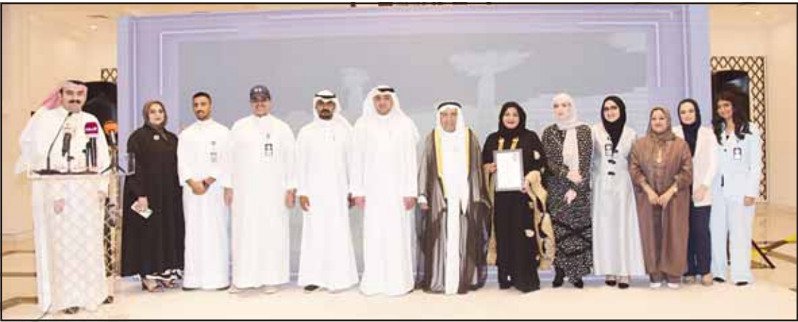
Group photo during the Ibrahim Taher Al-Baghli Charity for Pious Sons celebration of the International Day of Parents.