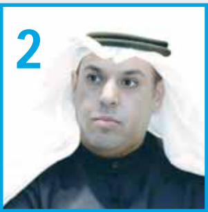
2 Protecting Kuwait's executive power from hidden networks