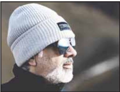
Kuwaiti photographer Mohammad Murad won the first place in the Big Picture competition in California, USA.