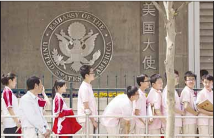
Chinese students wait outside the US Embassy for their visa application interviews, in Beijing on May 2, 2012.

oritize students hoping to enroll at colleges where foreigners make up less than 15% of the student body, a US official familiar with the matter said. The official spoke on condition of anonymity to detail information that has not been made public. Foreign students make up more than 15% of the total student body at almost 200 US universities, according to an Associated Press analysis of federal educa-