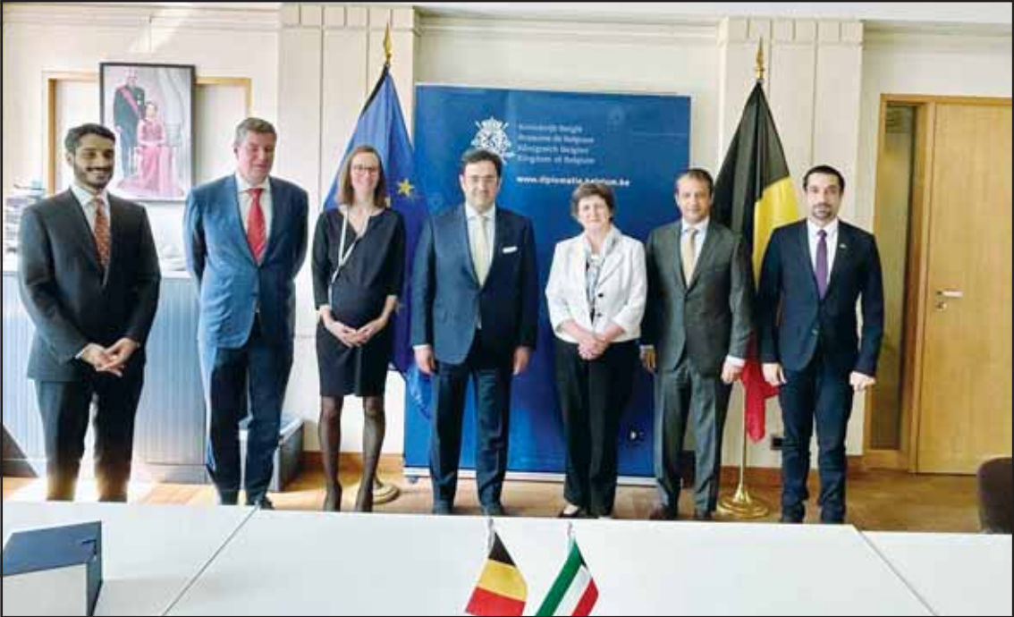
The State of Kuwait and Belgium hold the fifth round of political consultations in Brussels.