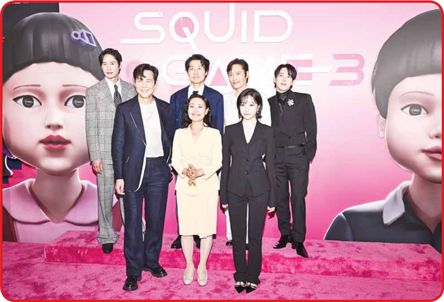
Park Sung-hoon, (from top left), Hwang Dong-hyuk, Lee Byung-hun, Yim Si-wan, Lee Jung-jae, from bottom left, Kang Ae-sim, and Jo Yu-ri attend the premiere of the third season of Netflix’s ‘Squid Game’ on Wednesday, June 18, at The Plaza Hotel in New York.