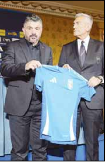
Newly appointed Italian national soccer team head coach Gennaro Gattuso, left, poses for photographers with Italian Soccer Federation, FGCI, president Gabriel Gravina during a press conference, in Rome.

sacrifice, great professionalism and diligence. He told me right away that nobody wins alone, that you win as a squad and a group." Gattuso said he wants to set a new standard of dedication whereby even injured players remain at the national team's training center. "We have plenty of physical therapists and medical staff," Gattuso said. "If I had listened to my body, I would have played 50 fewer matches. We need to go beyond our limits." Gattuso said he had already made calls to 35 players, including Federico Chiesa. Chiesa was a standout on the Italy team that won the European Championship in 2021 but hasn't played much since leaving Juventus for Liverpool last year. "I told Chiesa that he needs to find a way to play more regularly," Gattuso said. One player who Gattuso did not call was 37-year-old defender Francesco Acerbi, who turned down his call up for the Norway match, where he was expected to mark Erling Haaland. "I respect him," Gattuso said. "But I called other, younger players who I think can offer us something."