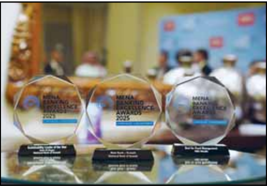
MEED Banking Excellence Awards