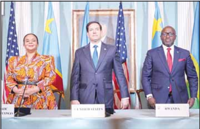
US Secretary of State Marco Rubio hosts a signing ceremony in which Congo's Foreign Minister Therese Kayikwamba Wagner, (left), and Rwanda's Foreign Minister Olivier Nduhungirehe, (right), pledge to work toward a peace deal at the State Department in Washington on April 25.

the world's worst humanitarian crises and has displaced more than 7 million people. Also: KINSHASA, Congo: Congo's Minister of Justice Constant Mutamba announced his resignation on Wednesday following an investigation into the alleged embezzlement of $19 million, according to a statement released by the former minister. Mutamba has been under investigation for allegedly embezzling funds intended to finance the construction of a prison in Kisangani, a city in the north of the country. In his statement, Mutamba, 37, claimed the legal actions against him were a plot by the Rwandan government. "After escaping several attempts at poisoning and physical elimination, the mafia networks, including those infiltrated in the service of our enemies, succeeded in humiliating me because of my commitment," he said. Earlier this year Mutamba advocated for the use of the death penalty for journalists who covered the actions of Rwandan-backed M23 rebels in the east, saying on the social media platform X that anyone who reports on "the activities of the Rwandan army and its M23 auxiliaries, will now suffer the full force of the law." Appointed in 2024, Mutamba was a presidential candidate in 2023 and has previously positioned himself as an anti corruption figure in a country whose development has been stifled by chronic corruption with its population of more than 100 million people struggling with high poverty and hunger levels despite its rich minerals.