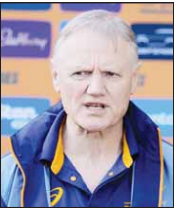
Australia Rugby's head coach Joe Schmidt comments at Stanmore Public School in Sydney, Australia after the announcement of the rugby union squad that will be considered for a position in the three-test series against the British and Irish Lions.

SYDNEY, June 19, Wallabies head coach Joe Schmidt has picked uncapped Corey Toole and Nick Champion de Crespigny, recalled giant lock Will Skelton and given veteran prop James Slipper a chance to push for another Lions series in a 36-man Australia squad selected for next month's test against Fiji. The Australians will play Fiji on July 6 at Newcastle, north of Sydney, in preparation for a three-test series against the British and Irish Lions, which starts July 19 in Brisbane.