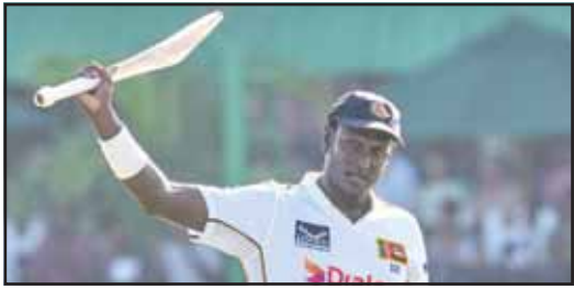
Sri Lanka's Angelo Mathews who plays his career last match leaves the ground after losing his wicket during day three of the first cricket test match between Sri Lanka and Bangladesh in Galle, Sri Lanka. — See Page 15