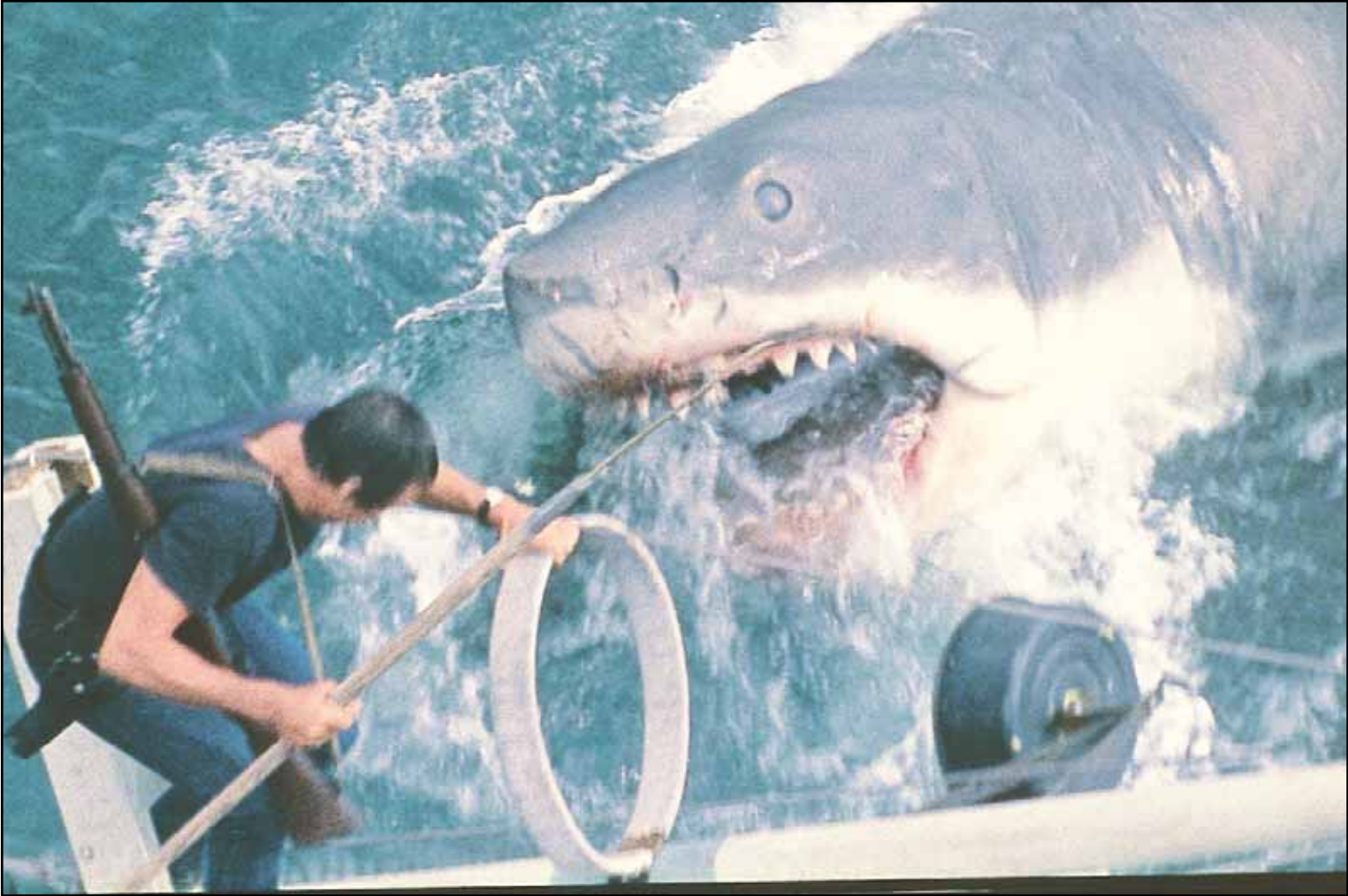
This image released by Peacock shows Roy Scheider in a scene from 'Jaws.'

But if "Jaws" is one of the most influential movies ever made, Hollywood hasn't always drawn the right