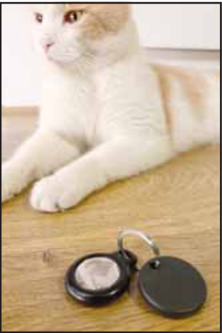
An Apple Air Tag and a Chipolo Bluetooth tracker are seen on a keyring next to a cat in London, Thursday, May 29, 2025.