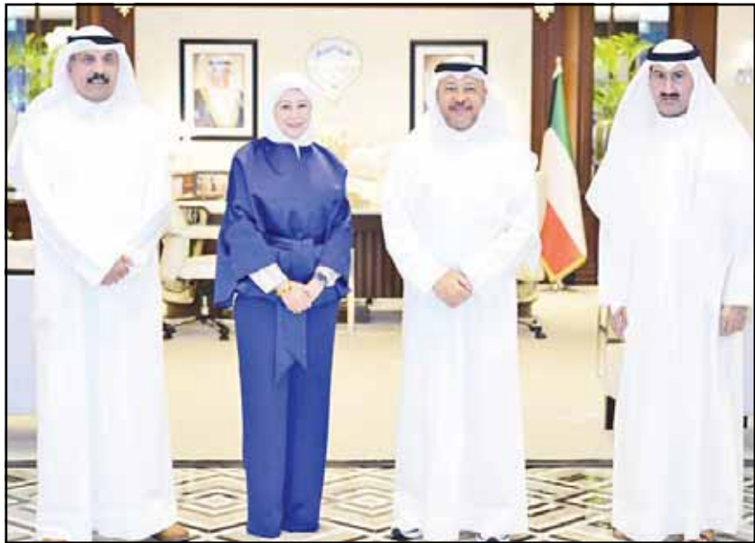
Farwaniya Governor Sheikh Athbi Nasser Al-Athbi Al-Sabah received at his office the newly appointed members of the Farwaniya Governorate Council.

Through these initiatives, the CSC reaffirmed its full commitment to provide technical and administrative support to ministries and government agencies to ensure the successful implementation of governance principles. These efforts aim to promote transparency, improve institutional performance, and establish accountable, efficient and reliable public administration.