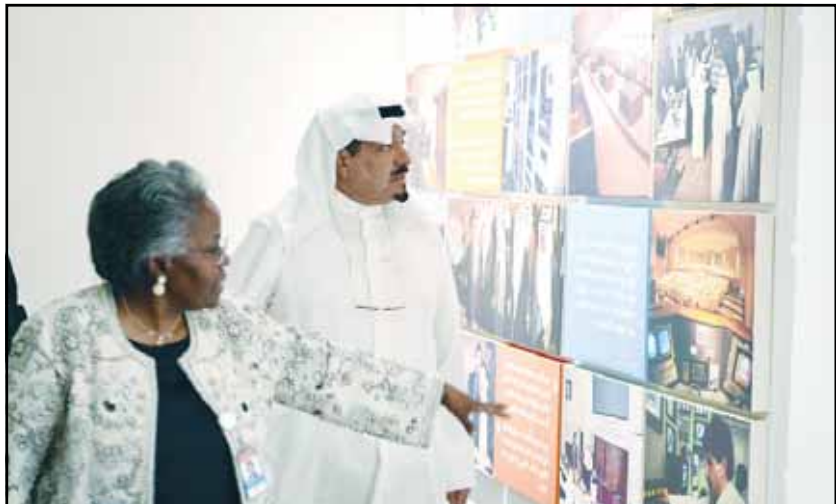
His Highness the Prime Minister Sheikh Ahmad Abdullah Al-Ahmad Al-Sabah being briefed on KFAS achievements.