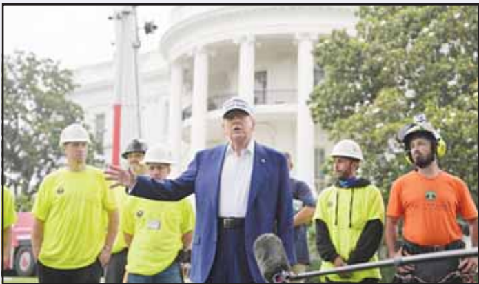
US President Donald Trump speaks as a flag pole is installed on the South Lawn of the White House on June 18, in Washington.

WASHINGTON, June 19, US President Donald Trump on Wednesday downplayed any notion that his supporters are cooling on him amid uncertainty over whether he will order a US strike on Iran, addressing a rift between some of his most vocal MAGA backers and national security conservatives. “My supporters are more in love with me today, and I’m more in love with them, more than they even were at election time where we had a total landslide,” Trump told reporters as a new flagpole was erected at the White House, with machinery whirring in the background. “I may have some people that are a little bit unhappy now, but I have some people that are very happy, and I have people outside of the base that can’t believe that this is happening, they’re so happy,” he said. Trump huddled Tuesday in the Situation Room with his national security team, and on Wednesday, Defense Secretary Pete Hegseth told lawmakers on Capitol Hill that the Pentagon was providing Trump with possible options on Iran but would not say whether the military was planning to assist with Israeli strikes. “I may do it, I may not do it,” Trump said Wednesday, in the exchange with reporters. “I mean, nobody knows what I’m going to do.”