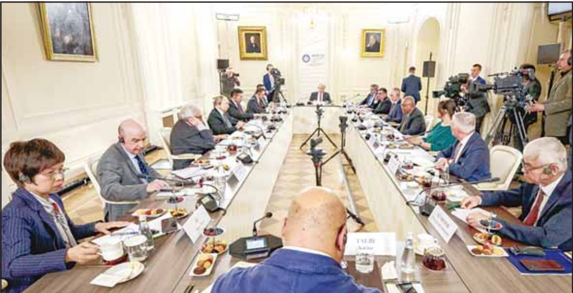
Russian President Vladimir Putin, (fourth left), meets with the heads of international news agencies at the newly renovated St. Petersburg Rimsky-Korsakov State Conservatory on the sidelines of the St. Petersburg International Economic Forum in St. Petersburg, Russia on June 19.

roads, and shutting down airspace. Temporary barricades and metal mesh fences surrounding the World Forum summit venue are just a fraction of the measures that radiate out from The Hague. Some 27,000 police officers - about half of the country’s entire force - will be on duty around the summit along with more than 10,000 defense personnel. Military police will protect delegations. Frigates will patrol the North Sea, F-35 fighter jets and Apache helicopters will take to the skies and air defense systems will be on alert. Bomb squads will comb the venue for explosives. Convoys carrying leaders will be whisked with military police escorts along closed-off highways from airports to their accommodations. While civilian drones are banned from the airspace around the summit and other key locations, police and military drones will buzz around the skies over the summit venue and other locations where leaders gather. Police and riot police also will be on hand for several protests that have already been announced, including an effort by demonstrators to shut down a major highway into the city.