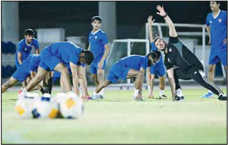
The Olympic team is preparing for the 2026 Asian Cup qualifiers.

The qualification format sees the top team from each of the ten groups, along with the five best second-placed teams, advancing to the final tournament. Saudi Arabia will join as the host nation, with the finals featuring 16 teams divided into