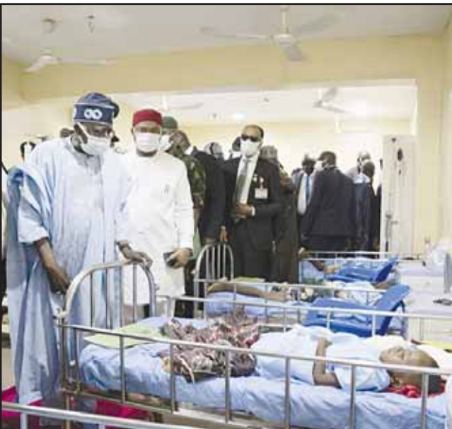
Nigeria President Bola Ahmed Tinubu visits the victims of a recent gun attack on a village at the hospital in Benue, north-central, Nigeria on June 18.

ABUJA, Nigeria, June 19, Nigeria's President Bola Tinubu has directed security agencies to hunt down the perpetrators of a weekend attack that killed at least 150 people in the country's northcentral, as he faces growing pressure over a worsening security crisis. Tinubu visited Benue state, the site of the recent deadly attacks, seeking to calm tensions and promise justice for the victims. "We will restore peace, rebuild, and bring the perpetrators to justice. You are not alone," the Nigerian leader said on X. Assailants stormed Benue state's Yelewata community from Friday night till Saturday morning, opening fire on villagers who were asleep and setting their homes ablaze, survivors and the local farmers union said. Many of those killed were sheltering in a local market after fleeing violence in other parts of the state. Authorities in Benue state blamed herdsmen for the attack, a type of violence frequently seen in northern Nigeria's decadeslong pastoral conflict.