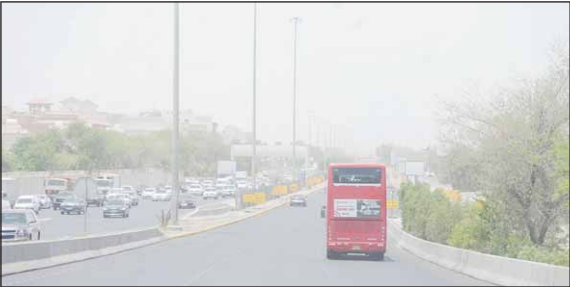
Vehicles navigate a dusty highway under low visibility conditions on Thursday. Hot, dry winds to persist through weekend