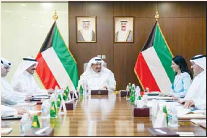
HH the PM chairs a meeting to follow up on the implementation of agreements and memoranda of understanding signed between the governments of Kuwait and China.

KUWAIT CITY, June 19, (KUNA): Kuwait marked its 64th Independence Anniversary on Thursday, celebrating a pivotal moment in the nation's history and the beginning of its journey toward development and sovereignty. The late Amir Sheikh Abdullah Al-Salem Al-Sabah signed the declaration of independence with the British Government Chief Political Resident in the Arabian Gulf Sir George Middleton, ending the protectorate agreement and paved way a journey of development. Sheikh Abdullah Al-Salem said: "On this day of our beloved nation ... On this day we move from one stage to another stage of history and we fold a page from the past ... and open a new page through this agreement through which Kuwait earned its complete independence and full sovereignty." Three years after the declaration, a decree was signed on May 18, 1964 merging the national day with the day in which Sheikh Abdullah Al-Salem assumed office, making it February 25. Celebrations were held on that day as of 1965. Sheikh Abdullah Al-Salem took Continued on Page 5