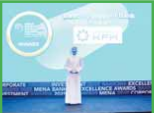
8 KFH named Best Investment Bank in Kuwait by MEED