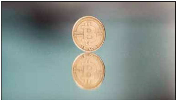
A bitcoin token is placed on a mirror for a photograph in Prague, Czech Republic on May 11. (AP)

PRAGUE, June 19, (AP): The Czech government survived a parliamentary no-confidence vote called by the main opposition party on Wednesday over a bitcoin-related scandal. Only 94 opposition lawmakers in the 200-seat lower house of Parliament voted in favor of dismissing the four-party coalition led by conservative Prime Minister Petr Fiala. At least 101 votes were needed to oust the government at the end of a two-day debate. The main opposition centrist ANO (YES) movement led by populist billionaire Andrej Babiš requested the vote after the Justice Ministry accepted a donation of bitcoins and sold them for almost 1 billion Czech koruna ($47 million) earlier this year. Justice Minister Pavel Blažek resigned from his post over the issue on May 30 and was replaced by Eva Decroix on June 10. Blažek said he wasn’t aware of any wrongdoing, but didn’t want the coalition to be harmed by the scandal. Fiala said he believed Blažek acted with goodwill. Decroix said she will order an in-