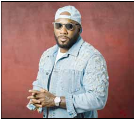
Jeezy poses for a portrait on Tuesday, June 10, in New York.

In honor of the album's 20th anniversary, Jeezy is launching his "TM:101 Live" tour on June 27 in Miami, encouraging fans to come sharply dressed for the upscale