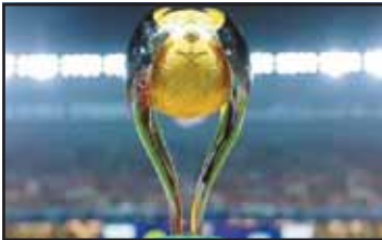
The Saudi Super Cup trophy.

Al-Hilal is the defending champion of the Saudi Super Cup, having