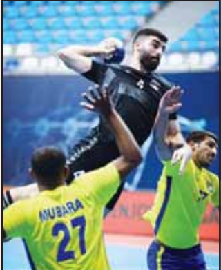
Players fighting for the ball.