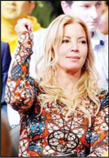
In this file photo, Los Angeles Lakers President Jeanie Buss dances in her seat to music as she attends the NBA basketball game between the Lakers and the Los Angeles Clippers in Los Angeles.