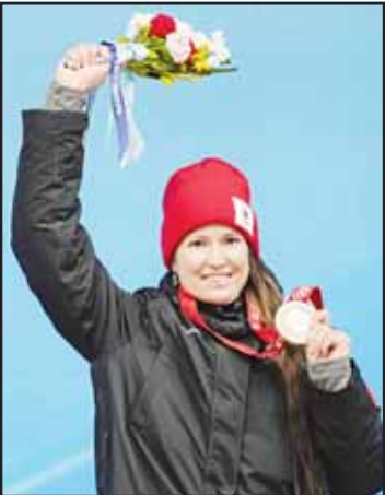
Tatyana Ivanova, of Russian Olympic Committee, celebrates winning the bronze medal in the luge women's singles at the 2022 Winter Olympics, Tuesday, Feb. 8, 2022, in the Yanqing district of Beijing.

Olympic bids. There were 28 sliders from Russia - 10 in luge, six in skeleton and 12 in bobsled - at the 2022 Beijing Games, though they competed under the Russian Olympic Committee flag and not the actual Russian flag. That was part of the sanctions levied against Russia for the state-sponsored doping scandal that overshadowed the 2014 Sochi Olympics. The Beijing Games closed four days before the attack on Ukraine started, and Russian athlete Tatyana Ivanova won a bronze medal in women's singles luge. At the 2024 Paris Olympics, Russia and military ally Belarus were excluded from team sports but athletes in individual sports could apply for neutral status to compete. A total of 32 accepted invitations from the International Olympic Committee after passing eligibility tests that included not publicly supporting the war and not having ties to military and state security agencies. The FIL reviewed the results of an anonymous polling of luge athletes who were surveyed about the prospect of letting Russian athletes resume sliding. It said the survey "revealed a broad range of concerns and opinions regarding safety, Olympic quotas, anti-doping compliance, and fairness." "Athletes hold a wide range of views," FIL athletes' commission chair Leon Felderer said. "There are many concerns and arguments on both sides."