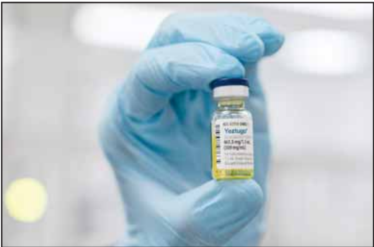
This photo provided by Gilead Sciences shows a vial of the company’s HIV prevention medication, Yeztugo, (lenacapavir) at a manufacturing facility in La Verne, Calif., in June 2025.

The world’s only twice-a-year shot to prevent HIV is the first step in an anticipated global rollout that could protect millions — although it’s unclear how many in the US and abroad will