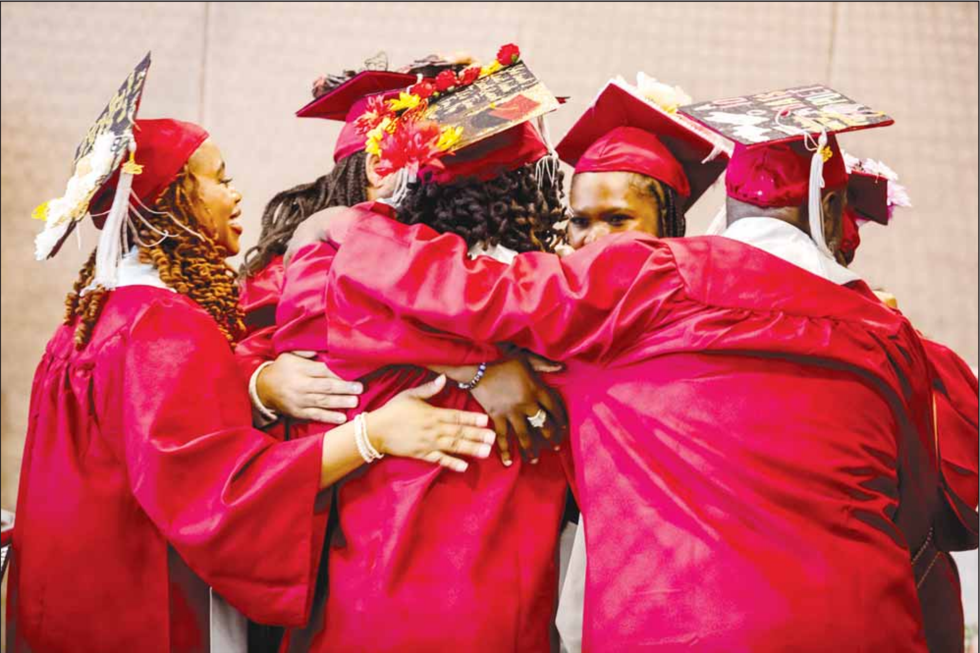
Graduates of Academy of Hope Adult Public Charter School hug following the organization’s graduation ceremony on Tuesday, June 17, 2025 in Washington. Students received General Education Development (GED) diplomas, National External Diploma Program (NEDP) degrees, Certified Nurse Aide Training (CNAT), and CompTIA A+ IT certifications.

The Conversation is an independent and nonprofit source of news, analysis and commentary from academic experts.