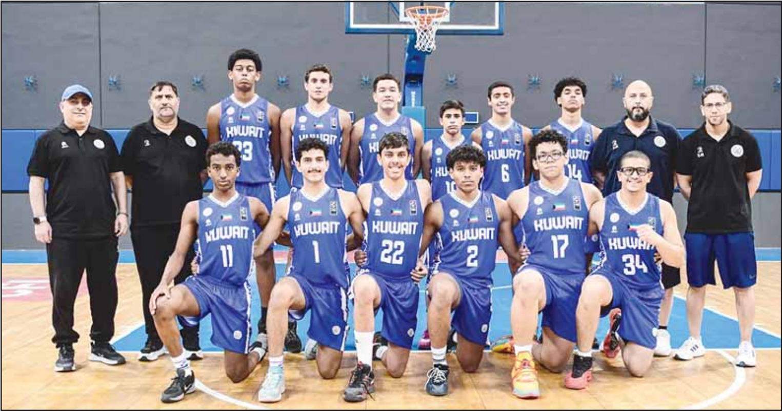
Kuwait junior basketball team.