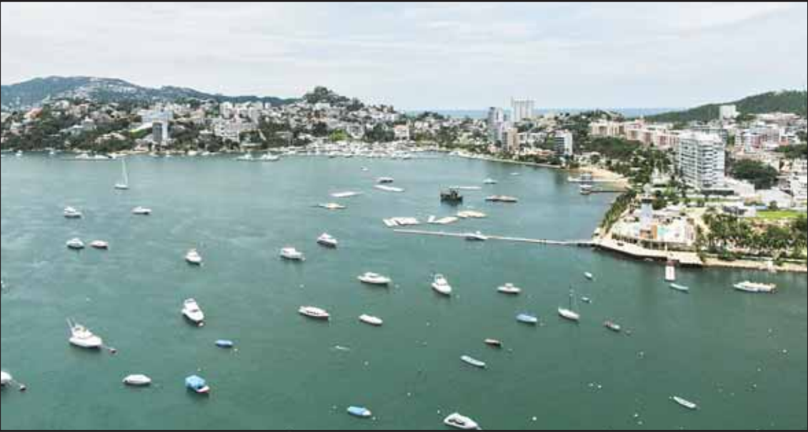
Boats are anchored near Manzanillo beach to be removed from water ahead of the arrival of Hurricane Erick in Acapulco, Mexico on June 18. (AP)

Powerful Hurricane Erick made landfall in Mexico's southern state of Oaxaca early Thursday, the National Hurricane Center in Miami said. The hurricane's center was located about 20 miles (30 kilometers) east of Punta Maldonado. Its maximum sustained winds were clocked at 125 mph (205 kph). It was moving northwest at 9 mph (15 kph), the hurricane center said. The storm was downgraded slightly before making landfall, from a powerful Category 4 to a Category 3. While slightly reduced in power, Erick is still considered a major hurricane as a Category 3, which can carry winds of up to 129 mph (210 kph). The storm threaded the needle between the resorts of Acapulco and Puerto Escondido, tearing into a sparsely populated stretch of coastline near the border of Oaxaca and Guerrero states. Agricultural fields blanket the low-lying coastal area between small fishing villages. Erick is expected to rapidly weaken as it crashes into the coastal mountains of southern Mexico, and the system is likely to dissipate late Thursday or early Friday, the hurricane center said. The storm threatened to unleash destructive winds near where the eye crashes ashore, flash floods and a dangerous storm surge, forecasters said. (AP)