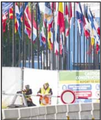
Security ahead of the NATO summit in The Hague, Netherlands on June 18.