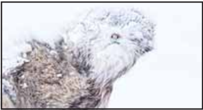
The photo 'Eyeless' won the first place in the Big Picture competition in California, USA.

sharing this moment with the world, stressing that "this victory is not only for me, but for dear Kuwait and for raising its name in international forums." He dedicated this achievement to His Highness the Amir Sheikh Meshal Al-Ahmad Al-Jaber Al-Sabah and His Highness the Crown Prince Sheikh Sabah Al-Khaled Al-Hamad Al-Sabah, may God protect them, in recognition and appreciation of their continuous support for Kuwaiti youth in various fields.