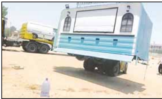
A makeshift 'baqala' is carried away by the municipality.

While conducting a security tour in Salmiya, the officers got suspicious of a car. They signaled for the driver to stop, and then found out that the driver was under the influence of drugs. They also uncovered narcotics and drug paraphernalia in his possession.