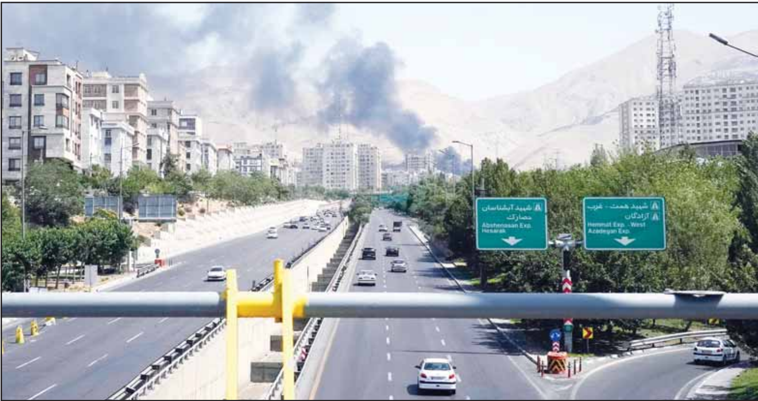
Smoke rises from an oil storage facility after it appeared to have been struck by an Israeli strike on Saturday, in Tehran, Iran, Monday, June 16, 2025.