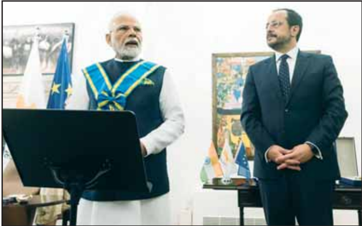
India’s Prime Minister Narendra Modi, (left), and Cyprus’ President Nikos Christodoulides attend a news conference during their meeting at the Presidential Palace in Nicosia, Cyprus on June 16.

NICOSIA, Cyprus, June 16, India will step up its defense ties with Cyprus through collaboration between the two countries’ respective defense industries, the Indian prime minister said Monday. Prime Minister Narendra Modi didn’t offer details, but he said talks would begin on boosting bilateral maritime and cybersecurity cooperation. He said after talks with Cypriot President Nikos Christodoulides that the two countries would also set up an information exchange mechanism geared toward combatting the threat of terrorism. Modi’s two-day visit to Cyprus, ahead of his trip to Canada for the G7 summit, is the first by an Indian prime minister in more than two decades. In a joint declaration, the two countries also pledged to expand maritime cooperation through more frequent Indian navy calls to Cypriot ports and looking at enhancing joint maritime training and search and rescue operations. Modi underscored the role of the envisioned India-Middle East-Europe Economic Corridor (IMEC) as a means to usher peace and prosperity in the Middle East. Cyprus figures to act as the linchpin between India, the Middle East and Europe in the trade, energy and digital connectivity corridor, given the island nation’s geographical location as the nearest European Union country to the