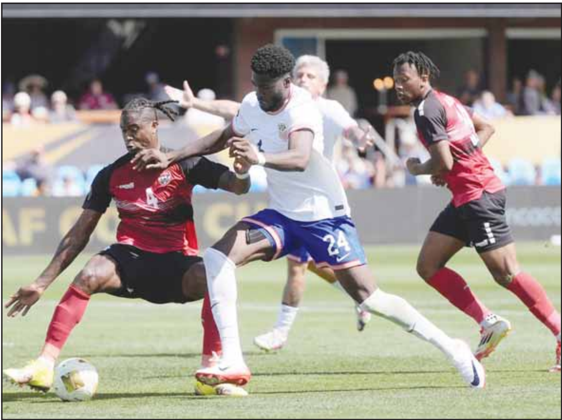
United States forward Patrick Agyemang (24) runs toward the ball against Trinidad and Tobago defender Sheldon Bateau (4) during the second half of a CONCACAF Gold Cup soccer match in San Jose, Calif.

Matt Freese was in goal in place Matt Turner, who had started 14 consecutive competitive matches for the U.S. and 23 of 24 dating to the 2022 World Cup. The lone exception was a Gold Cup group stage game against St. Kitts and Nevis in 2023. Missing Pulisic, Yunus Musah, Weston McKennie, Tim Weah, Gio Reyna, Antonee Robinson, Tyler Adams, Folarin Balogun and Sergio Dest, the U.S. starting lineup averaged 14.8 international appearances. That was the second-fewest for the Americans in a Gold Cup opener behind 9.8 against Bermuda in 2009, according to Opta. Adams (turf toe), Johnny Cardoso and Damion Downs (both illness) didn't dress. Defender Tim Ream started, extending his Gold Cup span for the U.S. to 14 years and surpassing DaMarcus Beasley (2002-15) for the American high. Trinidad, coached by former star Dwight Yorke, has lost four of its last five games and has been outscored 46-0 in its last 13 games against the U.S. on American soil. In the other Group D game, Saudi Arabia beat Haiti 1-0 at San Diego as Saleh Al-Shehri converted a 21st-minute penalty kick after Frantzy Pierrot pulled him down by his jersey.