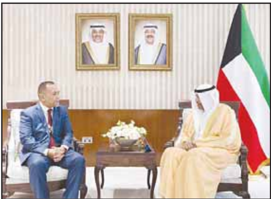
FM meets Tuvalu envoy.