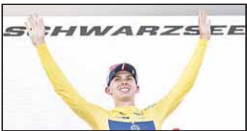
The leader of the overall classification France's Romain Gregoire of Groupama - FDJ team celebrates on the podium after the second stage, a 177 km race from Aarau to Schwar-zsee, at the 88th Tour de Suisse UCI World Tour cycling race, in Schwar-zsee, Switzerland.