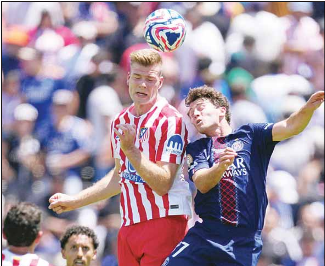
Atletico Madrid's Alexander Sorloth, left, goes for a header with Paris Saint-Germain's Joao Neves during the Club World Cup group B soccer match between PSG and Atletico Madrid, in Pasadena, Calif.