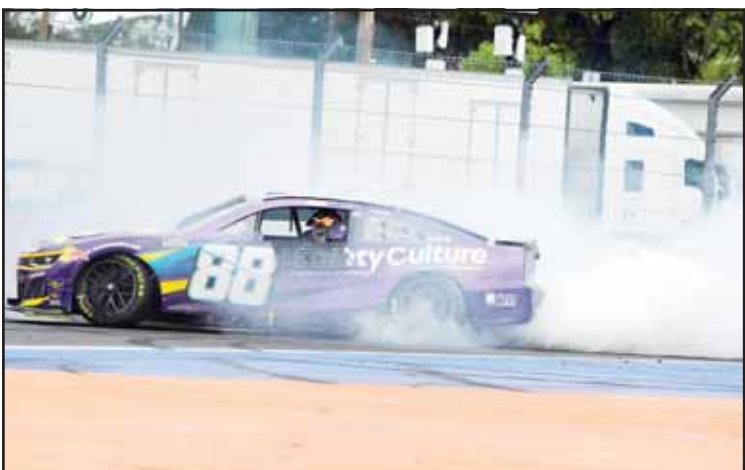
Shane Van Gisbergen celebrates his victory with a burn out during a NASCAR Cup Series auto race at Hermanos Rodríguez race track in Mexico City.

"It means everything to us, this is why I'm here," Van Gisbergen said. "I am getting better and more competitive. We're really making a lot of progress." Van Gisbergen celebrated in his traditional rugby-style way - he drop-kicked a signed football into the grandstands and then said he had recovered enough to enjoy "some Red Bulls mixed with adult beverages" later Sunday. Van Gisbergen benefitted from an early pop-up rain shower on the first lap of the race because he's an exceptionally skilled driver on a wet surface. His win at Chicago was in monsoon-like conditions. Trackhouse now has two of its drivers - Ross Chastain and Van Gisbergen - locked into the playoffs. But it was a bit of a disappointment for Daniel Suarez, the Monterrey native who thrilled the hometown crowd with a win in the Xfinity Series race on Saturday, as he failed to challenge his teammate for the win and finished 19th. "I wish I was in the mix fighting for it a little more, but it just wasn't in the cards," Suarez said. "Every single thing about this weekend exceeded my expectations, the people, the fans, the sponsors, the excitement, the energy."