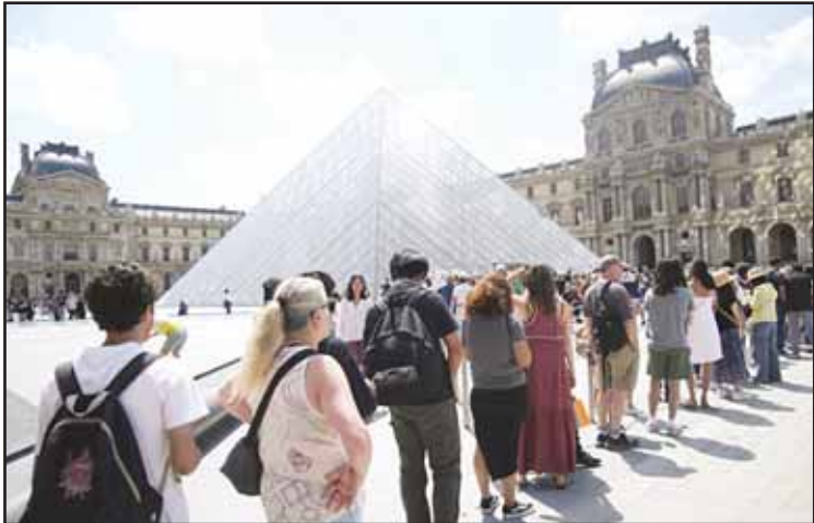
Tourists wait in line outside the Louvre museum which failed to open on time Monday, June 16, 2025 in Paris. (AP)

PARIS, June 16, (AP): The Louvre, the world’s most-visited museum and a global symbol of art, beauty and endurance, remained shuttered Monday - not by war, not by terror, but by its own exhausted staff, who say the institution is crumbling from within. It was an almost unthinkable sight: the home to works by Leonardo da Vinci and millennia of civilization’s greatest treasures - paralyzed by the very people tasked with welcoming the world to its galleries. And yet, the moment felt bigger than a labor protest. The Louvre has become a bellwether of global overtourism - a gilded palace overwhelmed by its own popularity. As tourism magnets from Venice to the Acropolis scramble to cap crowds, the world’s most iconic museum is reaching a reckoning of its own. The spontaneous strike erupted during a routine internal meeting, as gallery attendants, ticket agents and security personnel refused to take up their posts in protest over unmanage-