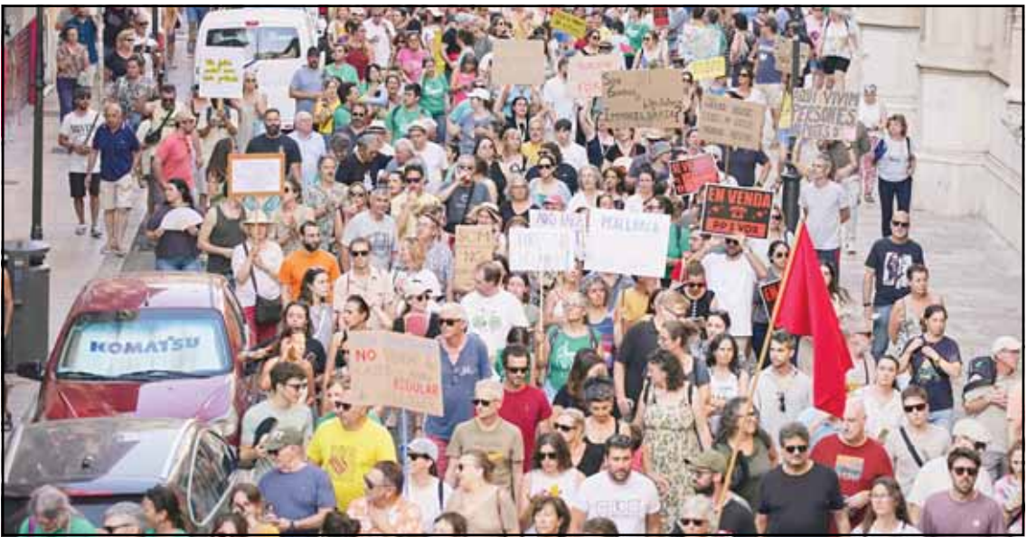
People march during a protest against overtourism in the Balearic island of Mallorca, Spain on June 15. Signs read in mallorquin, ‘For Sale’.