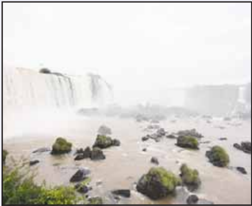
Iguazu water falls in Foz do Iguazu, Brazil on June 15.

1 dead, 10 hurt in Brazil hot air balloon crash: An unlicensed hot air balloon carrying tourists crashed Sunday in southeast Brazil’s Sao Paulo state, killing one person and injuring 10 others, the military police said. Some 35 people were on board the balloon when it crashed in a rural part of Capela do Alto, a town near Ipero, from where it had taken off. The dead victim was a 26-year-old woman. Brazilian news channel GloboNews reported that the balloon was not licensed to fly for recreational or tourism purposes, and the pilot was arrest following the crash. The Brazilian Balloon Confederation, based in the city of Boituva, also said the aircraft was not registered with the organization. (Xinhua)