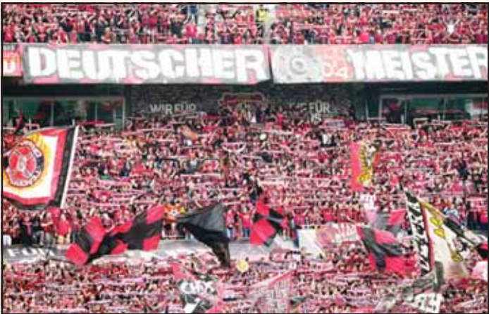
In this file photo, Bayer 04 Leverkusen fans cheer their team ahead of the German Bundesliga soccer match between Bayer Leverkusen and FC Augsburg at the BayArena in Leverkusen, Germany.

DUESSELDORF, Germany, June 16, Top German soccer clubs including Bayer Leverkusen and Leipzig face the prospect of handing over more control to fans in future after a regulator intervened. A statement Monday from Germany's antitrust regulator, the Federal Cartel Office, said it wants to see tighter enforcement of the rule known as 50-plus-1 which requires a soccer club's membership to have majority voting rights over how the team is run. The regulator said recent European court rulings suggest permanent exemptions from 50-plus-1 for last year's champion Leverkusen and fellow top-tier club Wolfsburg seem "no longer possible." It said efforts should be made in the future to ensure the club's professional soccer operations come under the control of membership organizations, but didn't name any deadline. Leverkusen and Wolfsburg were founded as workers' teams at major companies which own the clubs, with pharmaceutical giant Bayer at Leverkusen, and car manufacturer Volkswagen at Wolfsburg. Their long-term involvement led to the