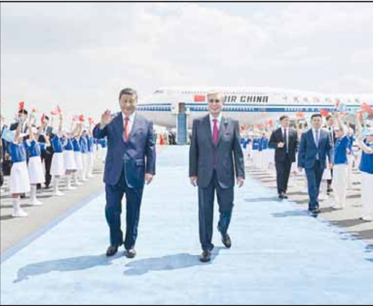
In this photo released by Kazakhstan’s Presidential Press Office, Chinese President Xi Jinping, (left), walks with Kazakh President Kassym-Jomart Tokayev upon his arrival at the international airport outside Astana, Kazakhstan, on June 16.

ASTANA: Chinese President Xi Jinping landed Monday to attend the second China-Central Asia Summit. Xi was welcomed by Kazakh President Kassym-Jomart Tokayev and other senior officials at the airport. After Xi’s plane entered Kazakh airspace, fighter jets of Kazakhstan’s air defense forces took off to escort it. Kazakh teenagers and children, holding the national flags of China and Kazakhstan , warmly welcomed Xi’s visit. Accompanied by Tokayev, Xi watched the march-past performed by the guard of honor, as helicopters bearing the flags of both countries flew over the airport. Inside the airport VIP lounge, the two heads of state also enjoyed performances by Kazakh teenagers and children.