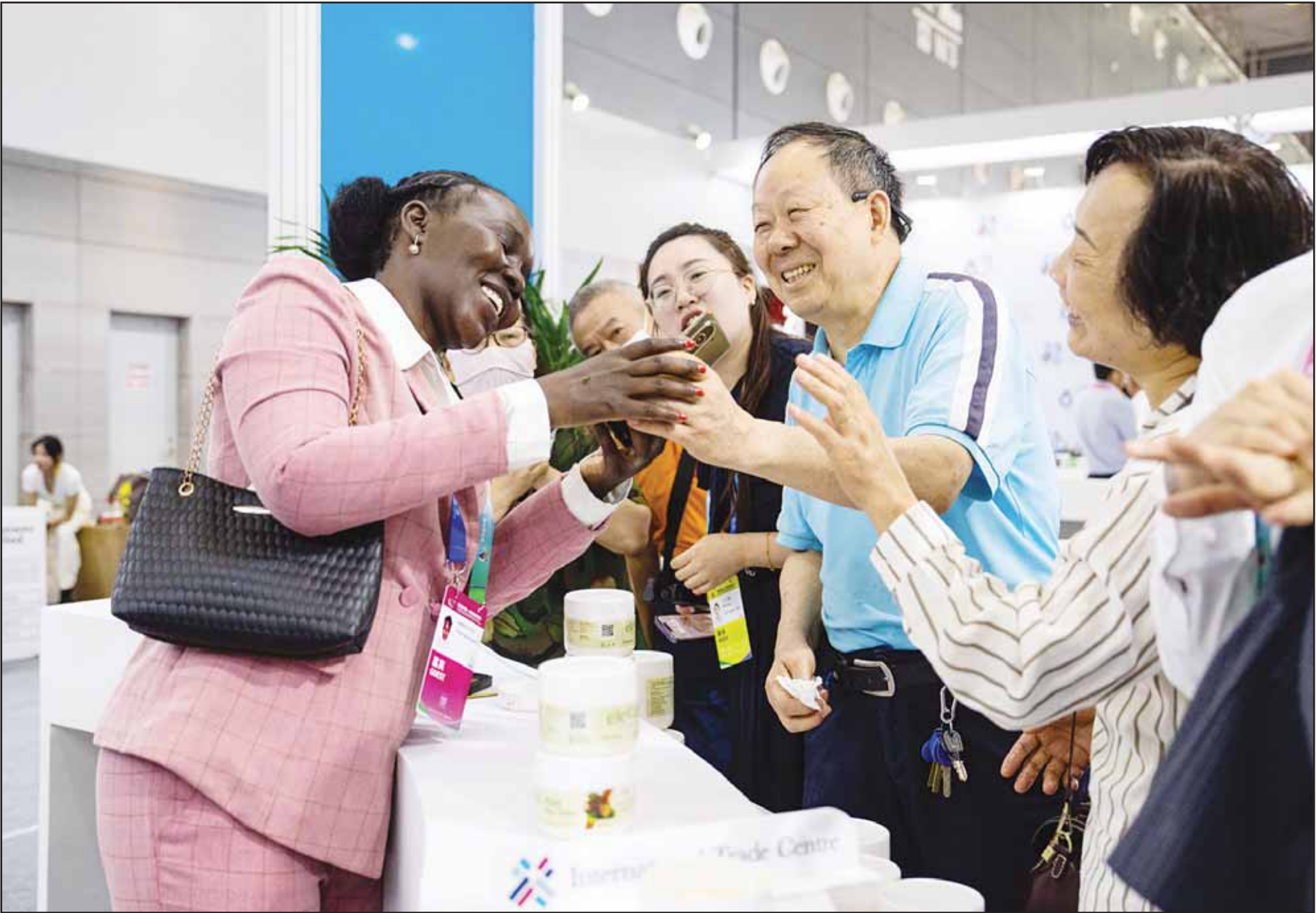
An exhibitor (left) communicates with visitors during the fourth China-Africa Economic and Trade Expo at Changsha International Convention and Exhibition Center in Changsha, central China's Hunan Province, June 13, 2025.

‘ Vibrant colors filled every corner, offering visitors a sensory journey through Africa’s rich soil, artisanal craftsmanship, and growing economic potential. ’