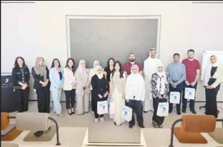
A group photo of AUK students with Burgan Bank representatives during a field visit to the Bank's headquarters.

"Teach Them Young" campaign, a primary factor of our robust learning and talent development program's success is that we acknowledge the importance of preparing talents at an early stage through visits such as this one, which opens them up to the real professional world, how it operates, and the technologies that continue to shape it. This