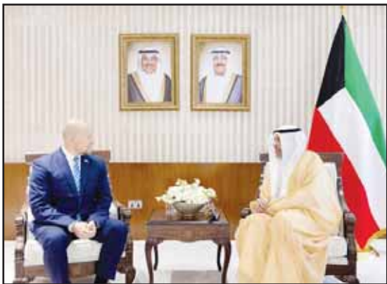
FM meets Belarussia envoy.