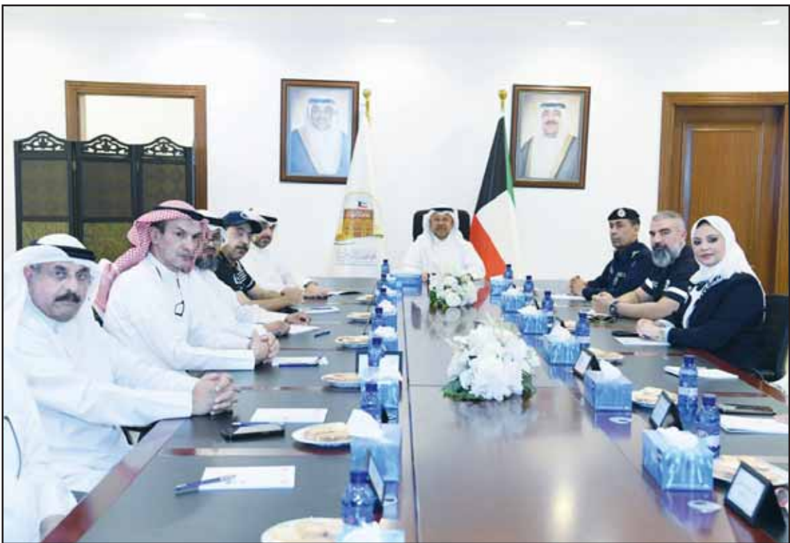
Farwaniya Governor Sheikh Athbi Nasser Al-Athbi Al-Sabah meets new members of Farwaniya Governorate Council.