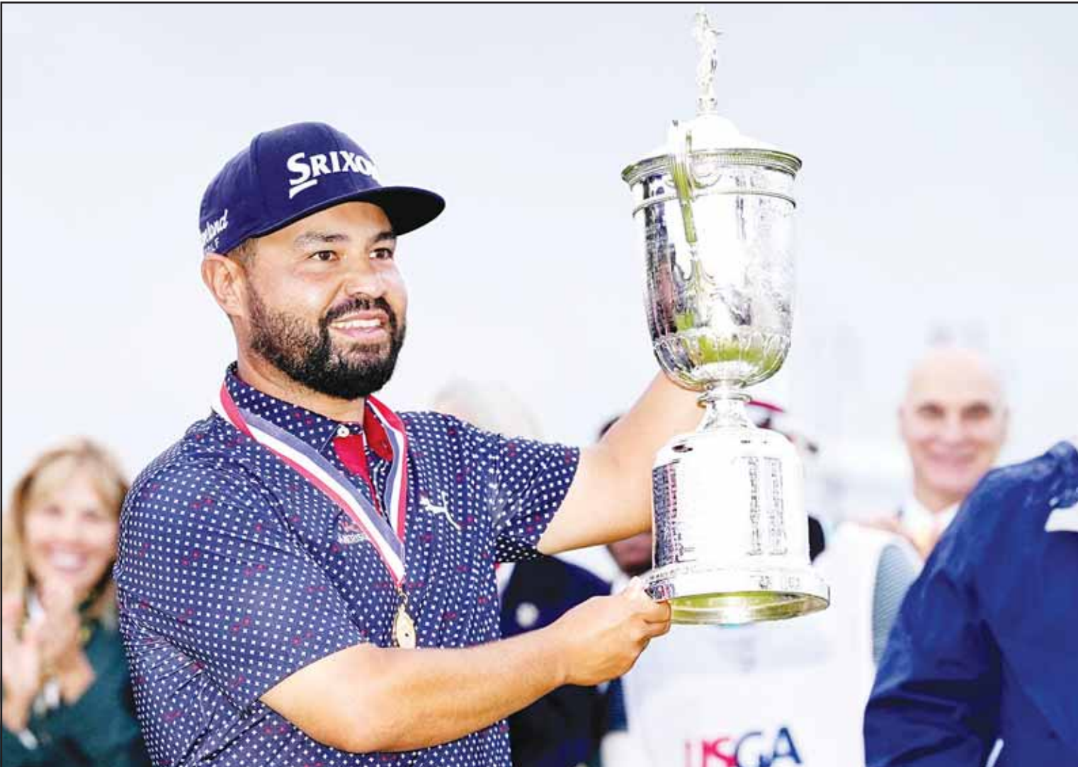
J.J. Spaun celebrates with the trophy after winning the U.S. Open golf tournament at Oakmont Country Club in Oakmont, Pa.

OAKMONT, Pa., June 16, J.J. Spaun turned a sloppy mess of a U.S. Open at wet and nasty Oakmont into a thing of beauty at the end Sunday with two stunning shots that carried him to his first major championship. First came his driver on the 314-yard 17th hole onto the green for a birdie that gave him the lead. Needing two putts from 65 feet on the 18th to win, he finished his storybook Open by holing the longest putt all week at Oakmont for birdie and a 2-over 72. That made him the only player to finish under par at 1-under 279. It gave him a two-shot victory over Robert MacIntyre of Scotland. And it made Spaun, the 34-year-old Californian who resembles the late Pittsburgh Steelers great Franco Harris, a major champion in only his second U.S. Open. He finished last year at No. 119 in the world with only one PGA Tour title in his career. "I never thought I would be here holding this trophy," said Spaun, who finished last year at No. 119 in the world and moved up to No. 8 with his U.S. Open victory. "I always had aspirations and dreams. I never knew what my ceiling was. I'm just trying to be the best golfer I can be." "I'm happy to display that here at Oakmont." MacIntyre birdied the 17th and split the fairway on the 18th for a key par, a 68 and the clubhouse lead. Three groups later, Spaun de