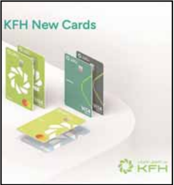
KFH new cards

Environmentally friendly Highlighting the advantages of the virtual card, AlArbeed mentioned that it provides customers with flexible payment options customized according to