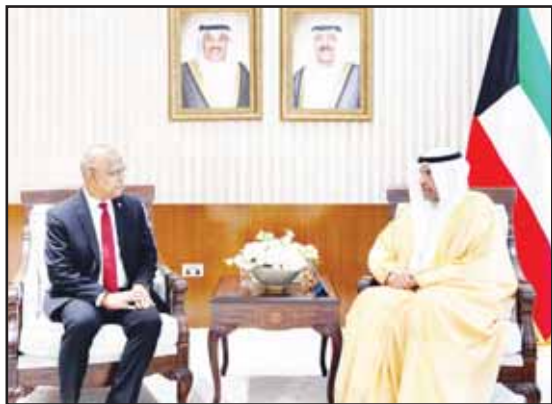
FM meets Maldives envoy.