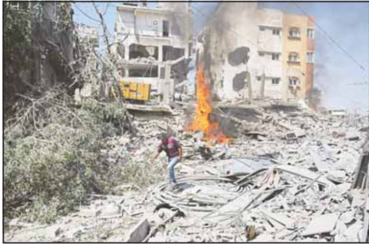
A Palestinian man walks across the rubble of a building destroyed by an Israeli strike in Deir al-Balah, central Gaza Strip, Monday, June 16, 2025.