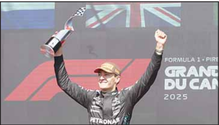
Mercedes driver George Russell, of the United Kingdom, celebrates after winning the F1 Canadian Grand Prix auto race in Montreal.

MONTREAL, June 16, — George Russell won his first race of the Formula 1 season as the Mercedes driver held off defending race winner Max Verstappen at the Canadian Grand Prix on Sunday. It was the fourth victory of Russell's career, and the race ended under yellow when McLaren teammates Oscar Piastri and Lando Norris staged a wheel-to-wheel late battle that ended with Norris hitting the wall. "It's amazing to be back on the top step," Russell said. "I felt last year was a victory lost, so to get the victory and see (teammate) Kimi (Antonelli) on the podium, too, is an amazing day for the team. I think it shows the strength of our cars in the cooler conditions, so let's see in the coming races." Russell started on pole for the second consecutive year in Montreal and held the advantage for most of the race at Circuit Gilles Villeneuve. The British driver became the fourth race winner this year, joining points leader Piastri, Norris and Verstappen, the four-time reigning F1 champion. Verstappen, who has one more race to go before points drop off his license and eliminate the possibility of a one-race suspension, was satisfied with his second-place finish. "Was quite a good race, even though in the first two stints we were struggling with the tires," the Dutch