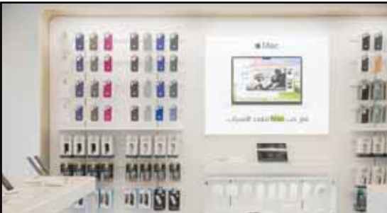
An interior view of the Gait retail location.

Shuwaikh. Regionally, Gait has also grown its footprint with two branches in Qatar – at Place Vendôme Mall and Printemps Doha. Customers can also shop Gait's full range online via www.gait.com.kw , www.gait.com.qa , and the brand's dedicated e-commerce platform.