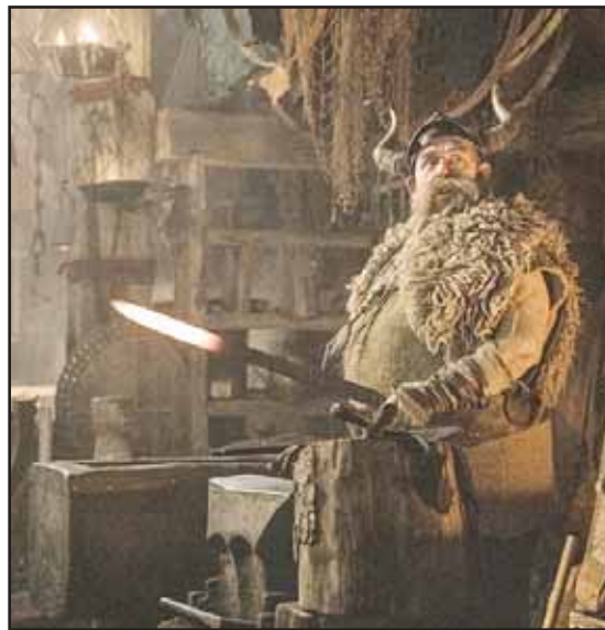
This image released by Universal Pictures shows Nick Frost as Gobber in a scene from ‘How to Train Your Dragon.’