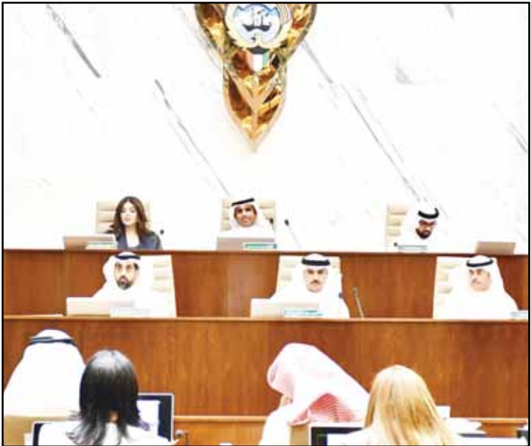
Under Abdullah Al-Muhari's chairmanship, the council addresses Metro project oversight, accessibility code updates, and infrastructure proposals in line with New Kuwait Vision.

KUWAIT CITY, June 16: The Municipal Council, under the chairmanship of Abdullah Al-Muhari, held its first regular session in the fourth legislative term on Monday. During the session, the council decided to implement Article 25 of the relevant law against the objections raised by Minister of State for Municipal Affairs Abdullatif Al-Mishari regarding the minutes of the council meeting held on April 28, 2025.