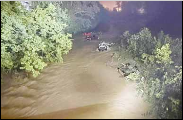
In this image provided by the Wheeling West Virginia Fire Department, cars sit submerged in floodwaters on June 14 in Wheeling, West Virginia.