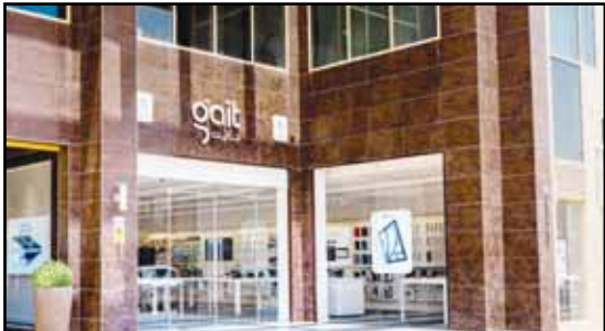
Exterior shot of the Shuwaikh store.

The Shuwaikh store offers a full range of Apple products, including Mac, iPhone, iPad, Apple Watch, and accessories, in addition to exclusive Apple services such as consulting with Apple-trained experts, in-store setup support, repairs, trade-in services, and hands-on demos to explore the best of Apple. The store is also equipped with extended warranty plans through GaitCare and GaitCare+, giving customers added assurance with repair