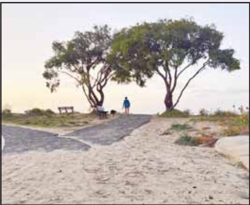
A person takes an evening walk on the shores of Geopraphe Bay of Indian Ocean, at Busselton town in western Australia on June 15.

Sydney shooting injures 3: Three people have been injured in a shooting in Sydney’s western suburbs on Monday. Police in the state of New South Wales (NSW) said in a statement that emergency services were called to a public place shooting in Auburn, 17 km west of central Sydney, about 1:15 pm local time on Monday. It said that three people with gunshot wounds were being treated at the scene by ambulance paramedics. A crime scene has been established and surrounding streets have been closed. (Xinhua) □ □ □ Police officer killed in Australia shooting: A police officer has been killed in a shooting in the Australian island state of Tasmania, local police reported on Monday. Tasmania Police said in a statement that an officer was approaching a house in the state’s northwest on Monday morning in relation to routine duties when they were allegedly shot by a member of the public. The police officer was critically injured and died at the scene. (Xinhua) □ □ □ ‘49 dead in fire accidents during 5 months’: A total of 49 people were killed and 67 others injured in fire-related incidents across Myanmar during the first five months of 2025, state-owned Myanmar Radio and Television reported on Sunday.