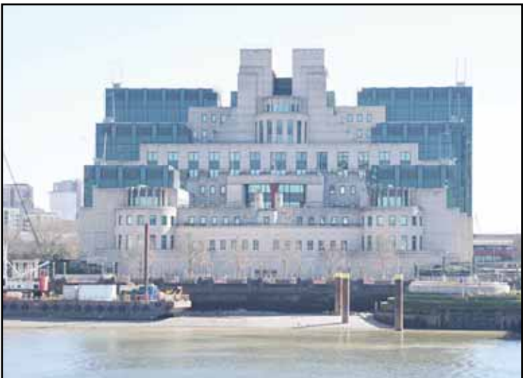
A general view of the headquarters of the Secret Intelligence Service, MI6, in London on March 18.

OTTAWA, Ontario, June 16, Britain’s real-life spies have finally caught up with James Bond. MI6 has appointed its first female chief. Prime Minister Keir Starmer announced Sunday that Blaise Metreweli will be the next head of the U.K.’s foreign intelligence agency, and the first woman to hold the post since its founding in 1909. She is currently the MI6 director of technology and innovation - the real-world equivalent of Bond gadget-master Q. A career intelligence officer, Metreweli, 47, steps from the shadows into the light as the only MI6 employee whose name is made public. She said “I am proud and honored to be asked to lead my Service.”