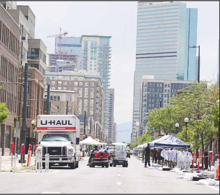
Volunteers work on putting up tents for displays for the Juneteenth celebration in the Five Points neighborhood where the event is staged Saturday, June 14, in Denver.