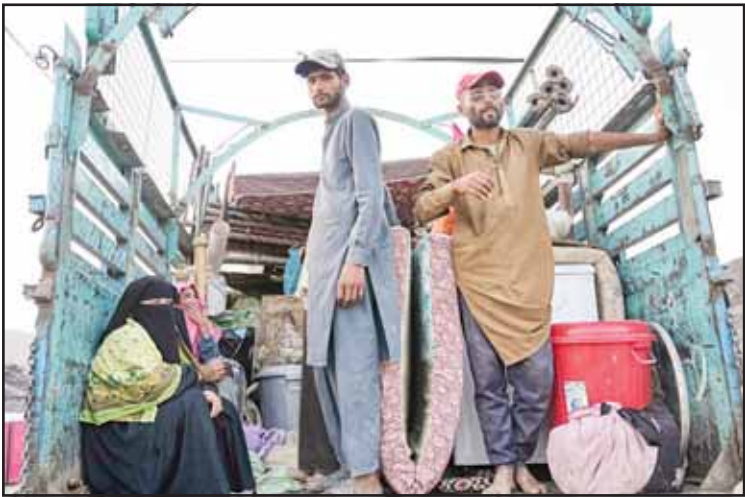
Repatriated Afghan refugees arrive at a camp after crossing the Pakistan-Afghanistan border, in Torkham, Afghanistan on May 31.