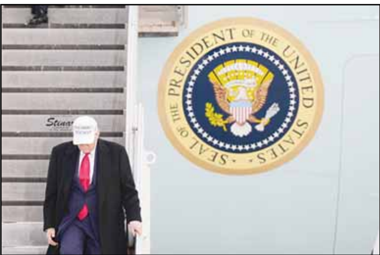
President Donald Trump arrives on Air Force One at Calgary International Airport, Sunday, June 15, 2025, in Calgary, Canada, ahead of the G7 Summit.

KANANASKIS, Alberta, June 16, When U.S. President Donald Trump last came to Canada for a Group of Seven summit, the enduring image was of him seated with his arms folded defiantly as then-German Chancellor Angela Merkel stared daggers at him. If there is a shared mission at this year’s G7 summit, which begins Monday in Canada’s Rocky Mountains, it is a desire to minimize any fireworks at a moment of combustible tensions. The 2018 summit ended with Trump assailing his Canadian hosts on social media as he departed on Air Force One, saying he had instructed the U.S. officials who remained in Quebec to oppose the G7 joint statement endorsed by the leaders of Japan, France, the United Kingdom, Italy, Germany and, of course, Canada. “I have instructed our U.S. Reps not to endorse the Communiqué as we look at Tariffs on automobiles flooding the U.S. Market!” Trump posted on the site then known as Twitter. This time, Trump already has hit several dozen nations with severe tariffs that risk a global economic slowdown. There is little progress on