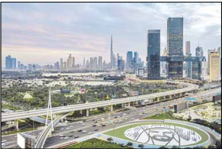
The Blue Line expansion can advance Dubai’s future as a global, liveable, and investable city, bringing massive implications for real estate.