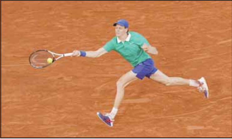
Italy's Jannik Sinner returns to Spain's Carlos Alcaraz during the final match of the French Tennis Open at the Roland-Garros Stadium in Paris.

PARIS, June 9, Bad starts in Grand Slam finals are nothing new for Carlos Alcaraz, and each time it's happened, he has won the tournament anyway. But not in such dramatic style as Sunday's French Open final, when the Spaniard rallied from two sets down and saved three match points to beat top-ranked Jannik Sinner 4-6, 6-7 (4), 6-4, 7-6 (3), 7-6 (10-2) for his fifth major title in as many finals. It was Alcaraz's second straight French Open title with a comeback, after trailing 2-1 in sets to Alexander Zverev in last year's final, and a third major title from behind, following his five-set win against Novak Djokovic in the 2023 Wimbledon final. "When the situations are against you, then you have to keep fighting. It's a Grand Slam final, it's no time to be tired, no time to give up," Alcaraz said. "Do I enjoy that? The real champions are made in those situations." In producing one of the greatest comebacks in the history of the clay-court tournament on Sunday, he emulated Djokovic's feat from the 2021 final at Roland-Garros - when the now 24-time major winner fought back from two sets down to beat Stefanos Tsitsipas. "Today it was all about the belief in myself," Alcaraz said. He became just the ninth player to rally from two sets down and win