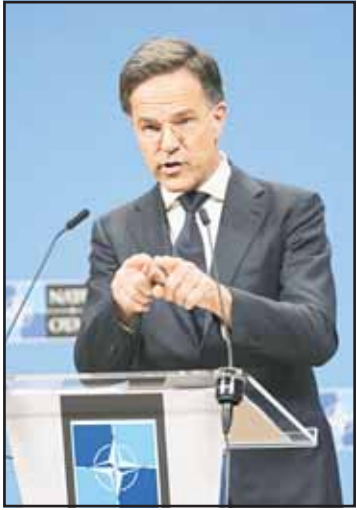
NATO Secretary General Mark Rutte speaks during a media conference prior to a meeting of the Ukraine Defense Contact Group at the NATO headquarters in Brussels on June 4.

LONDON, June 9, NATO members need to increase their air and missile defenses by 400% to counter the threat from Russia, the head of the military alliance plans to say on Monday. Secretary-General Mark Rutte will say during a visit to London that NATO must take a "quantum leap in our collective defense" to face growing instability and threats, according to extracts released by NATO before Rutte's speech. Rutte is due to meet UK Prime Minister Keir Starmer at 10 Downing St. ahead of a NATO summit in the Netherlands where the 32-nation alliance is likely to commit to a big hike in military spending. Like other NATO members, the UK has been reassessing its defense spending since Russia's full-scale invasion of Ukraine in February 2022. Starmer has pledged to increase British defense spending to 2.5% of gross domestic product by 2027 and to 3% by 2034. Rutte has proposed a target of 3.5% of economic output on military spending and another 1.5% on "defense-related expenditure" such as roads, bridges, airfields and sea ports. He said last week he is confident the alliance will agree to the target at its summit in The Hague on June 24-25. At the moment, 22 of the 32 mem