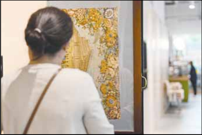
A member of public looks at a work of art in the collection at the V&A Storehouse in London, Thursday, June 5.