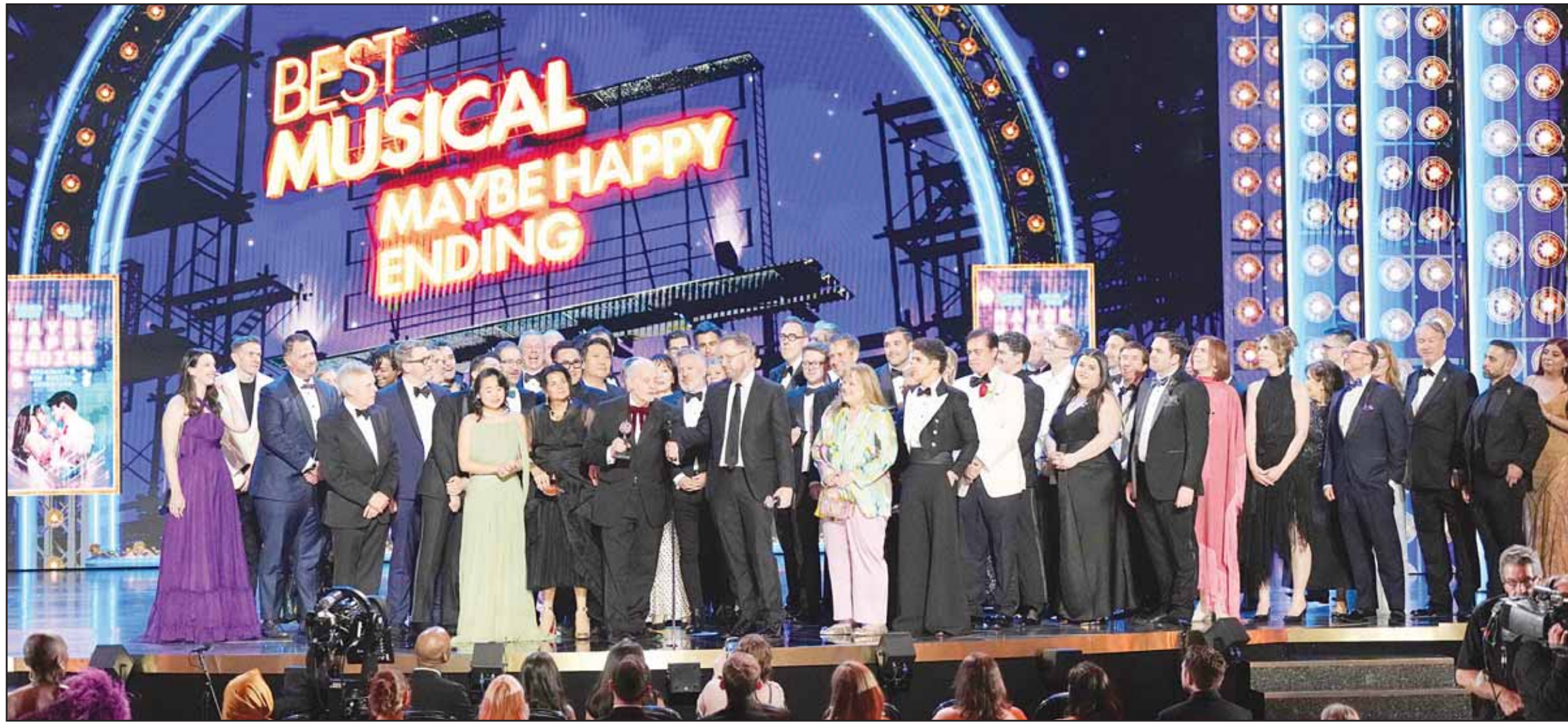
The cast and crew of 'Maybe Happy Ending' accept the award for best musical during the 78th Tony Awards on Sunday, June 8, at Radio City Music Hall in New York.