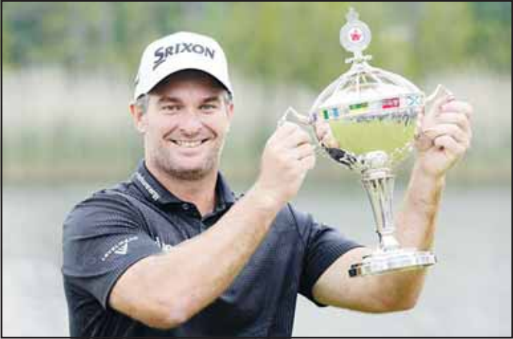
Ryan Fox poses with the championship trophy after winning the RBC Canadian Open golf tournament in Caledon, Ontario. the par-4 18th to finish at 15-under 198 at the Robert Trent Jones Golf Club. The 26-year-old Niemann also won this year in Australia, Singapore and Mexico. He