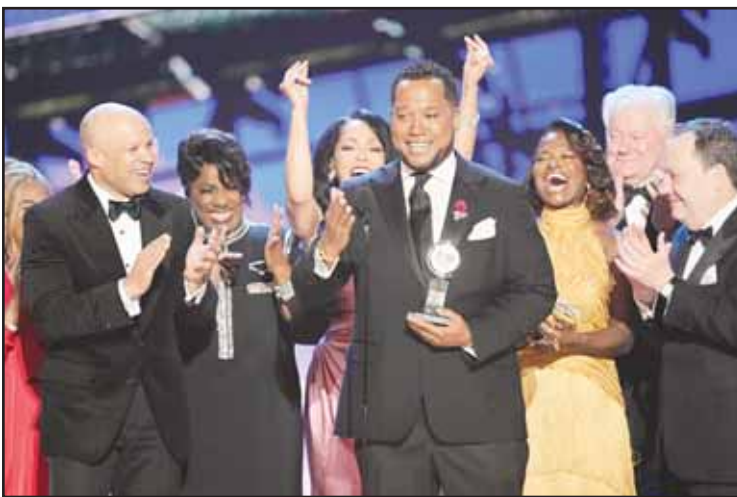
Branden Jacobs-Jenkins, (center), accepts the award for best play for 'Purpose' during the Tony Awards.