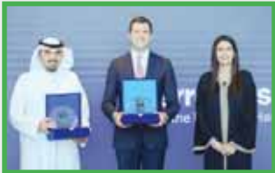
8 NBK exclusively partners with iconic luxury retailer Harrods to launch Kuwait's first 'NBK-Harrods Visa Infinite Credit Card'