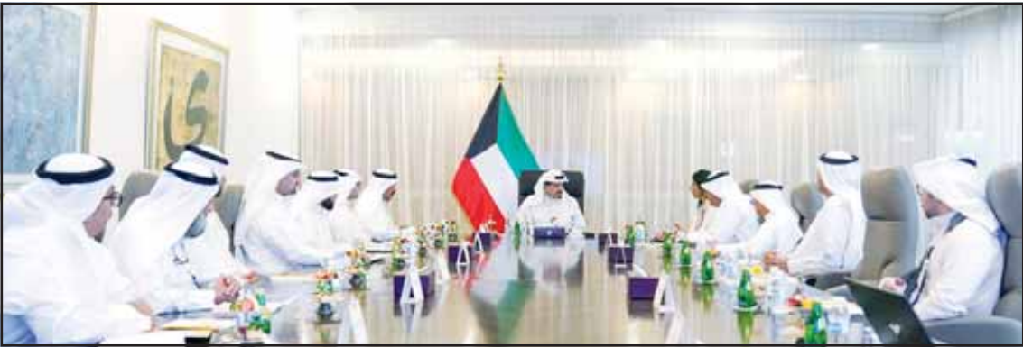
PM Diwan photo His Highness the Prime Minister convened a meeting of the coordinating committee to address housing project services in various ministries and the Credit Bank of Kuwait.