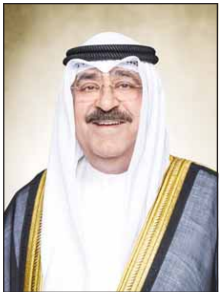
His Highness the Amir Sheikh Meshal Al-Ahmad Al-Jaber Al-Sabah