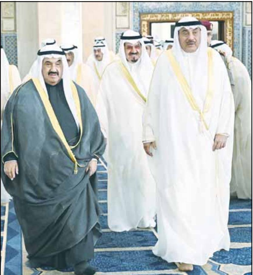
Crown Prince Diwan photo His Highness the Crown Prince Sheikh Sabah Khaled Al-Hamad Al-Sabah, HH the Prime Minister Sheikh Ahmad Abdullah Al-Ahmad Al-Sabah and Sheikh Nasser Al-Mohammad Al-Sabah entering the Grand Mosque for Eid prayer.

His Highness the Prime Minister Sheikh Ahmad Abdullah Al-Ahmad Al-Sabah sent a congratulatory cable to King of Sweden Carl XVI Gustaf on his country’s National Day on Friday.