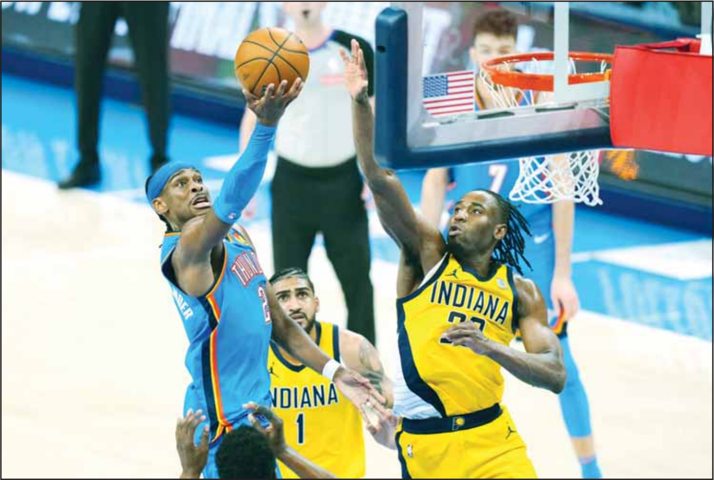
Oklahoma City Thunder guard Shai Gilgeous-Alexander (2) shoots against Indiana Pacers forward Aaron Nesmith (23) during the second half of Game 2 of the NBA Finals basketball series in Oklahoma City.

OKLAHOMA CITY, June 9, Shai Gilgeous-Alexander got some much-needed assistance from his teammates in Game 2 of the NBA Finals, and the Oklahoma City Thunder evened the series against the Indiana Pacers with a 123-107 victory. Gilgeous-Alexander scored 38 points in Game 1, but his supporting cast couldn’t get it going, and Tyrese Haliburton’s jumper in the final second gave the Pacers a 111-110 win. Gilgeous-Alexander had 34 points and eight assists in Game 2 – typical production from the league’s MVP and scoring champion. Co-stars Jalen Williams and Chet Holmgren played more like their usual selves on Sunday and ensured the Pacers had no chance to use their last-second magic. Veteran reserve Alex Caruso had another strong performance and Aaron Wiggins provided a surprise boost in