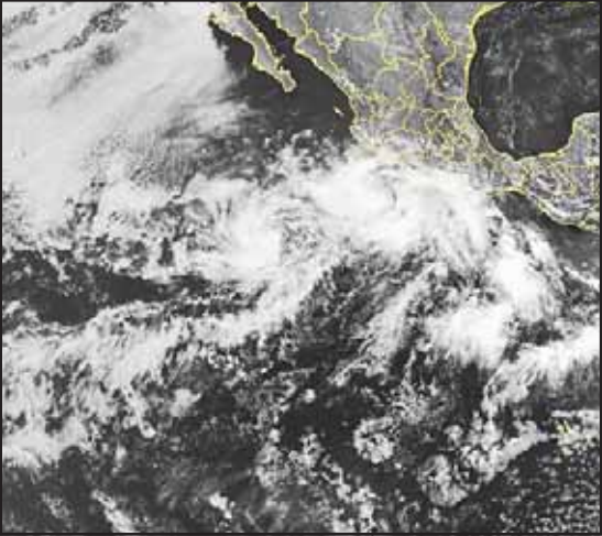
In this satellite image released by NOAA, Tropical Storm Barbara forms off the southwest coast of Mexico.

MIAMI, June 9, Two tropical storms gathered strength off Mexico's Pacific coast Monday, with one forecast to become a hurricane later in the day, forecasters warned. Tropical Storm Barbara was about 185 miles (295 kilometers) southwest of Manzanillo, Mexico early on Monday, with maximum sustained winds of 70 mph (110 kph), according to the U.S. National Hurricane Center in Miami. Barbara is expected to continue moving toward the west-northwest near 12 mph for the next couple of days. It will reach hurricane strength later on Monday but should begin weakening by Tuesday, the NHC said. The storm may bring total rainfall of 2 to 4 inches (51 to 101 millimeters) to coastal areas of Guerrero, Michoacan, Colima and Jalisco states, with the possibility of localized flooding on Monday. The NHC said swells from Barbara were likely to form life-threatening surf and rip current conditions along the southwestern Mexican coast, with gusty winds likely.