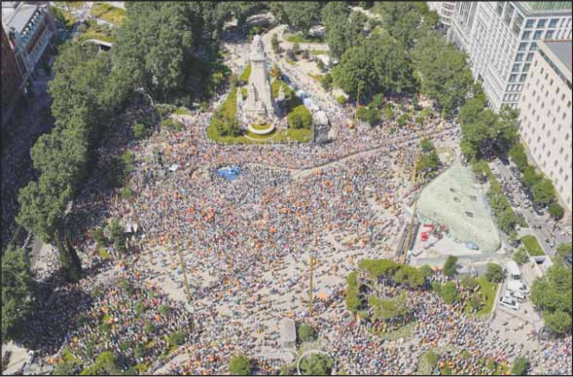
Supporters of Spain's mainstream conservative Popular Party wave Spanish national flags during a protest against Prime Minister Pedro Sanchez's government, in Madrid, Spain, on June 8.

Trump responded to McDonnell on Truth Social, telling him to arrest protesters in face masks. "Looking really bad in L.A. BRING IN THE TROOPS!!!" he wrote. Starting in the morning, the troops stood shoulder to shoulder, carrying long guns and riot shields as protesters shouted "shame" and "go home." After some closely approached the guard members, another set of uniformed officers advanced on the group, shooting smoke-filled canisters into the street.