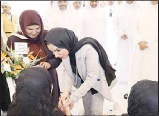
Minister Al-Huwailah during her visit at the elderly care house on Eid occasion.

KUWAIT CITY, June 9, (KUNA): Minister of Social Affairs, Family Affairs and Childhood Dr. Amthal Al-Huwailah on Friday visited the Farah Specialized Center for the Care and Rehabilitation of the Elderly, offering Eid greetings to the elderly and cases of special needs. The minister in a statement, affirmed the State adherence to continue providing care for the old citizens, those of special challenges and furnish them with means of dignified and stable living. Shortly earlier, Minister of Health Dr. Ahmad Al-Awadi addressed congratulations to His Highness the Amir Sheikh Meshal Al-Ahmad Al-Jaber Al-Sabah, His Highness the Crown Prince Sheikh Sabah Khaled Al-Hamad Al-Sabah and His Highness the Prime Minister Sheikh Ahmad Abdullah Al-Ahmad Al-Sabah, on Eid Al-Adha advent. He also congratulated the people of Kuwait, the Arab and Muslim nations wishing recurrence of the occasion with security and peace. The minister affirmed that the medical personnel were all ready to provide required services and care during the Eid. For his part, Minister of Information and Culture Abdulrahman Al-Mutairi congratulated His Highness the Amir Sheikh Meshal Al-Ahmad Al-Jaber Al-Sabah, His Highness the Crown Prince Sheikh Sabah Khaled Al-Hamad Al-Sabah, His Highness the Prime Minister Sheikh Abdullah Al-Ahmad Al-Sabah, the gracious people of Kuwait and the Islamic nation on advent of Eid Al-Adha.