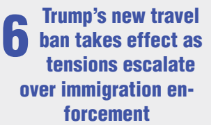
6 Trump's new travel ban takes effect as tensions escalate over immigration enforcement