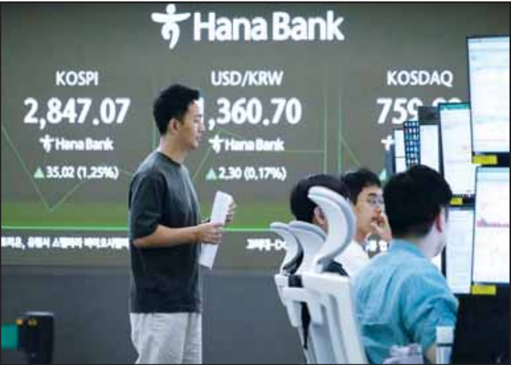
Currency traders work near a screen showing the Korea Composite Stock Price Index (KOSPI), left, and the foreign exchange rate between U.S. dollar and South Korean won, center, at the foreign exchange dealing room of the KEB Hana Bank headquarters in Seoul, South Korea, Monday, June 9, 2025.

portant trading partners. Hopes that Trump will lower his tariffs after reaching trade deals with other countries are a main reason the S&P 500 has rallied back so furiously since dropping roughly 20% two months ago from an all-time high. The economy is absorbing the impact from tariffs on a wide range of goods from key trading partners, along with raw materials such as steel. Heavier tariffs could hit businesses and consumers in the coming months. The U.S. economy contracted during the first quarter. Recent surveys by the Institute for Supply Management, a trade group of purchasing managers, found that both American manufacturing and services businesses contracted last month. On Tuesday, the Organization for Economic Cooperation and Development forecast 1.6% growth for the U.S. economy this year, down from 2.8% last year. The uncertainty over tariffs and their economic impact has put the Federal Reserve in a delicate position. In other trading early Monday, U.S. benchmark crude oil lost 21 cents to $64.37 per barrel. Brent crude, the international standard, gave up 23 cents to $66.24 per barrel. The U.S. dollar retreated to 144.09 Japanese yen from 144.85 yen. The euro edged higher, to $1.1426 from $1.1399.