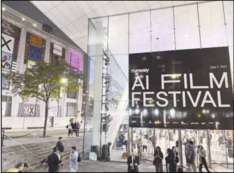
Runway’s third-annual AI Film Festival kicks off with a screening at Lincoln Center’s Alice Tully Hall in New York on Thursday, June 5.