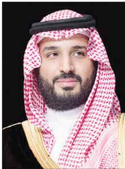
Saudi Crown Prince and Prime Minister Mohammed bin Salman bin Abdulaziz Al-Saud