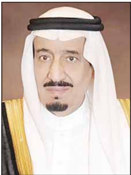
Custodian of the Two Holy Mosques Saudi King Salman bin Abdulaziz Al-Saud

KUWAIT CITY, June 9, (KUNA): His Highness the Amir Sheikh Meshal Al-Ahmad Al-Jaber Al-Sabah sent a cable of congratulations to the Custodian of the Two Holy Mosques Saudi King Salman bin Abdulaziz Al-Saud, commending the Kingdom of Saudi Arabia on the successful organization of the 1446 Hajj season.