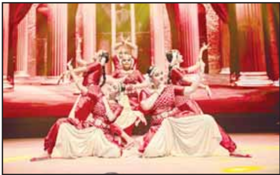
Photos during the Bharat Mahotsav anniversary celebrations.