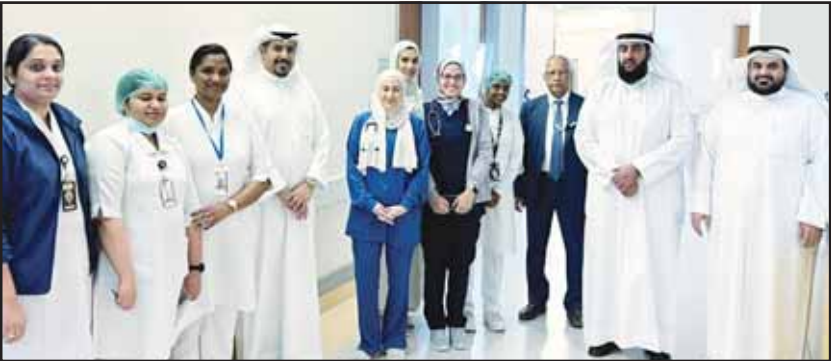
Health officials visited several hospitals, health centers on first day of Eid al-Adha.

KUWAIT CITY, June 5: The College of Graduate Studies at Kuwait University has announced the results of applicants who have been accepted and nominated for admission to its non-degree programs for the 2025/2026 academic year. Applicants are invited to use the QR code available on the university's official website to verify their acceptance.