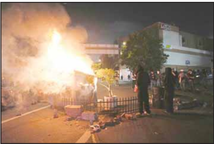
Protesters start fire in the trash dumpster near the metropolitan detention center of downtown Los Angeles on June 8.

LOS ANGELES, June 9, Tensions in Los Angeles escalated Sunday as thousands of protesters took to the streets in response to President Donald Trump's extraordinary deployment of the National Guard, blocking off a major freeway and setting self-driving cars on fire as law enforcement used tear gas, rubber bullets and flash bangs to control the crowd. Many protesters dispersed as evening fell and police declared an unlawful moving, a precursor to officers moving in and making arrests of people who don't leave. Some of those remaining threw objects at police from behind a makeshift barrier that spanned the width of a street and others hurled chunks of concrete, rocks, electric scooters and fireworks at California Highway Patrol officers and their vehicles parked on the closed southbound 101 Freeway. Officers ran under an overpass to take cover. Sunday's protests in Los Angeles, a sprawling city of 4 million people, were centered in several blocks of downtown. It was the third and most intense day of demonstrations against Trump's immigration crackdown in the region, as the arrival of around 300 Guard troops spurred anger and fear among many residents. The Guard was deployed specifically to protect federal buildings