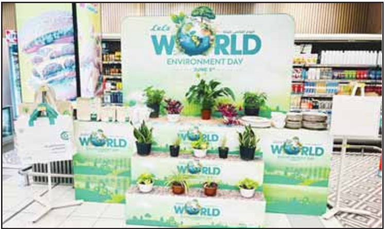
Biodegradable products and digital receipts highlight retailer's commitment to the planet.

is the launch of LuLu's "Go Paperless" E-Receipt Initiative, aimed at reducing the environmental impact of printed receipts. Shoppers are encouraged to switch to digital re-