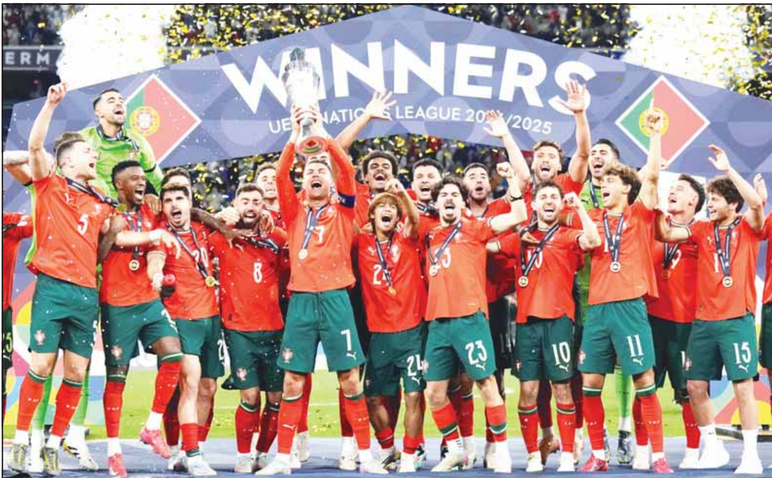
Portugal's Cristiano Ronaldo celebrates with teammates after winning the Nations League final soccer match between Portugal and Spain at the Allianz Arena in Munich, Germany.

Mbappé hits 50th goal as France secures third place