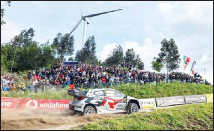
TOYOTA GAZOO Racing drivers in action during Rally de Portugal.

of the rally was one of the longest of the season so far, featuring 10 stages interrupted only by two brief remote service halts. Ogier and co-driver Landais ended the day in second place, just seven seconds off the lead. Ogier engaged in a close battle the following day with the leader and took con-