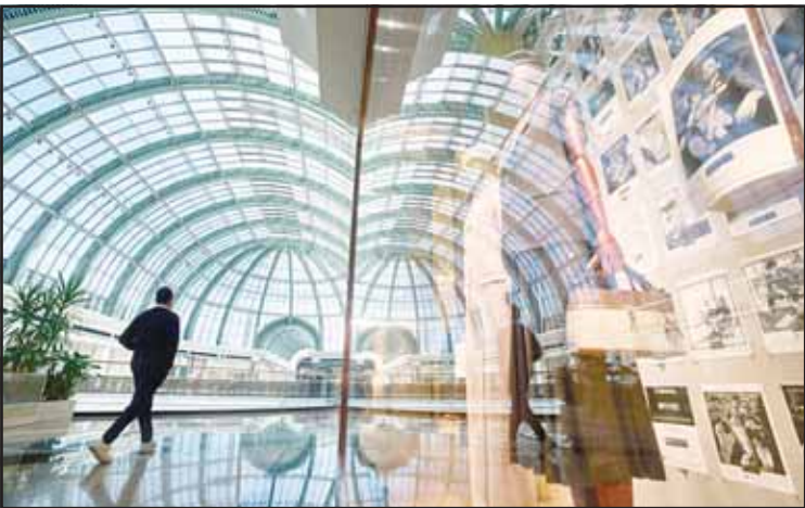
A man walks past a storefront inside Mall of the Emirates in Dubai, United Arab Emirates, April 17, 2025.

Responding to questions Monday from The Associated Press, the company appeared to acknowledge the