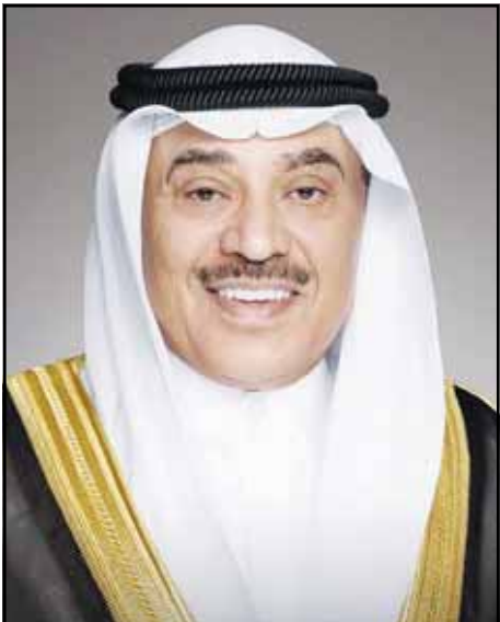
HH the Crown Prince