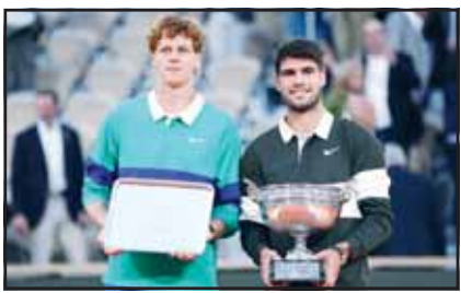
Winner Spain's Carlos Alcaraz, right, and second-placed Italy's Jannik Sinner pose with trophies after the final match of the French Tennis Open at the Roland-Garros Stadium in Paris. - See Page 14