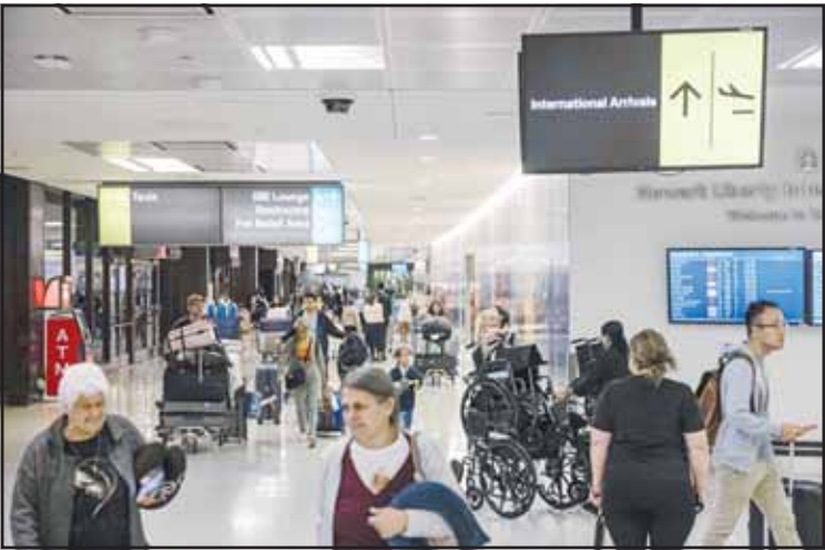
People carrying suitcases arrive from international flight at Newark Liberty International Airport on June 9 in New Jersey.