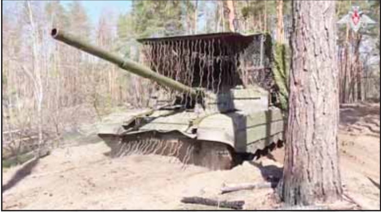
In this photo taken from a video released by Russian Defense Ministry Press Service on June 9, a Russian T-90 tank takes a position on an undisclosed location in Ukraine. (AP)

KYIV, Ukraine, June 9, (AP): Russia launched 479 drones in Ukraine in the biggest overnight drone bombardment of the 3-year war, the Ukrainian air force said Monday, as the Kremlin presses its summer offensive against the backdrop of direct peace talks. As well as drones, 20 missiles of various types were fired at different parts of Ukraine, according to the air force, which said the barrage targeted mainly central and western areas of Ukraine. Ukraine's air force said its air defenses destroyed 277 drones and 19 missiles in mid-flight on Sunday night, claiming that only 10 drones or missiles hit their target. Officials said one person was injured. It was not possible to independently verify the claims. A recent escalation in aerial attacks has coincided with a renewed Russian battlefield push on eastern and north-eastern parts of the roughly 1,000-kilometer (620-mile) front line. Ukraine's President Volodymyr Ze-