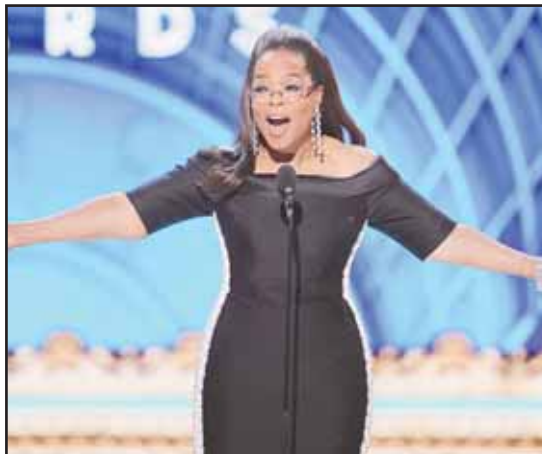
Oprah Winfrey presents the award for best performance by an actress in a leading role in a musical.

"There is nothing quite like bathing in the applause of a curtain call, but when I bow, I bow to the audience, with gratitude, knowing that without them I might as well be lip-syncing showtunes in my bedroom mirror," he said. "And so I dedicate this award to the people in the dark."