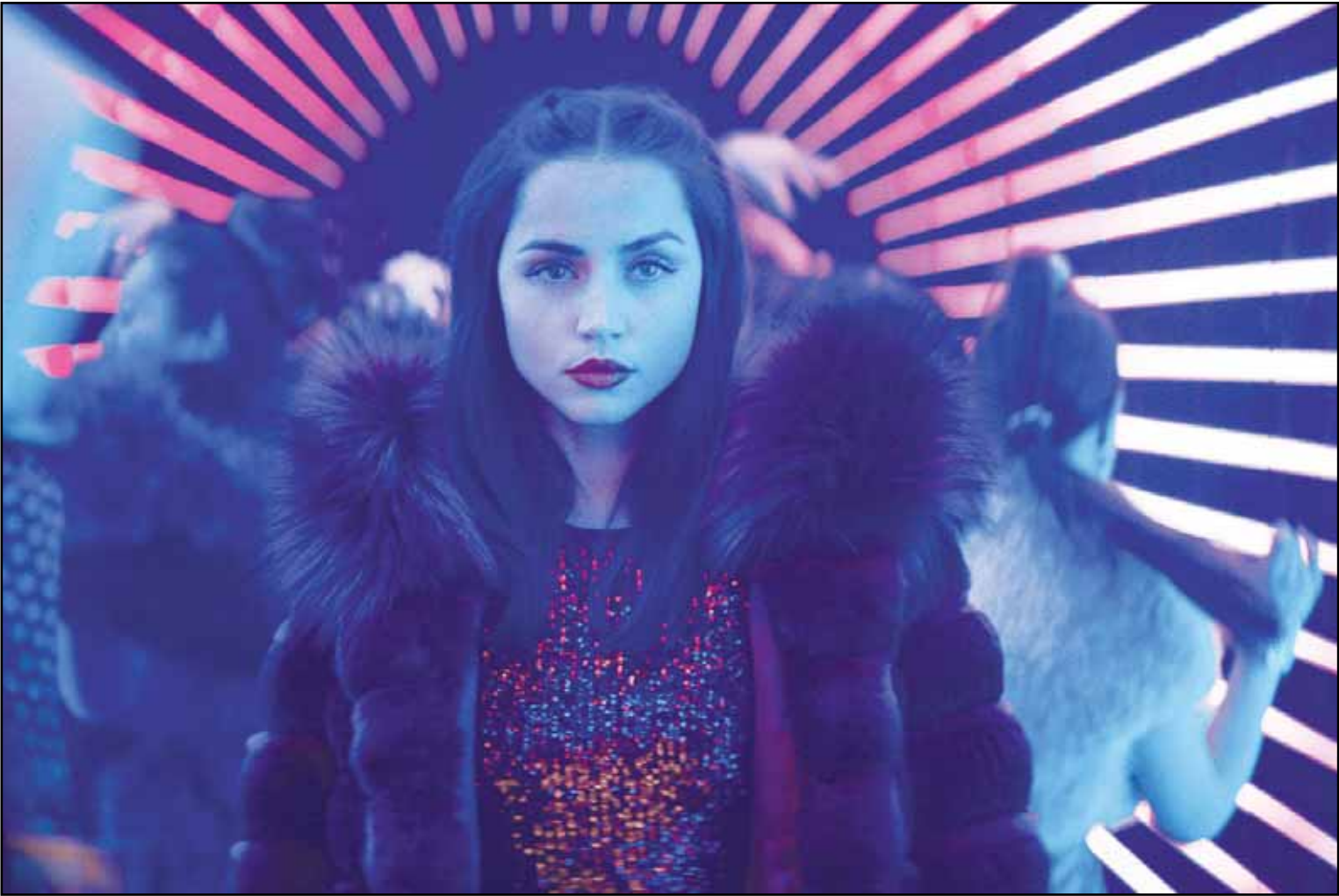
This image released by Lionsgate shows Ana de Armas in a scene from ‘Ballerina.’