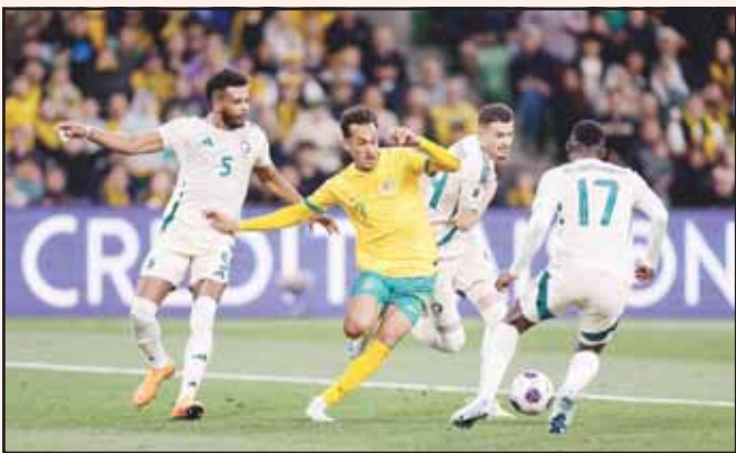
In this file photo, players challenge for the ball during a soccer match between Saudi Arabia and Australia.

MELBOURNE, June 9, A Saudi squad that has scored six goals through nine qualifying games needs to beat Australia by a five-goal margin to earn a direct spot at the 2026 World Cup. Head coach Herve Renard knows it’s an extremely unlikely outcome for his Saudi team, but he’s urging his players to go all in Tuesday in the last game of the third round of Asian qualifying for next year’s global tournament. “The door is closed but we have to try to qualify even if it is through the window,” Renard said after his team’s 2-0 win over Bahrain last week kept Saudi Arabia in contention. “Everything must go very well for us if we are to qualify; we have to score goals.” Anything less than a five-goal deficit means Australia – in second spot in Group C – qualifies for a seventh World Cup. The last time the Socceroos lost by such a margin was in successive 6-0 defeats