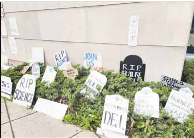
This photo obtained by The Associated Press shows cardboard tombstones symbolizing canceled research grants at the NIH Visitors Center in Bethesda, Md., Saturday, on June 7.