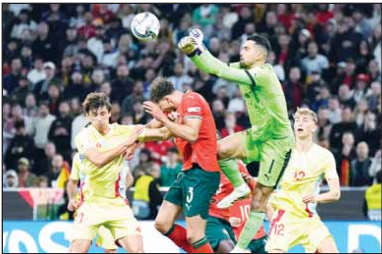
Portugal goalkeeper Diogo Costa punches out the ball during the Nations League final soccer match between Portugal and Spain at the Allianz Arena in Munich, Germany.

“It's a shame and it's tough, but with time it will be more appreciated,” Oyarzabal said. “We struggled more in the second half;