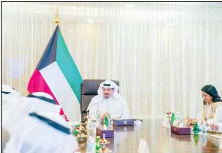
HH the PM chairs housing services meeting at Bayan Palace.