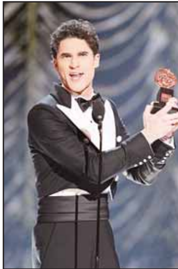
Darren Criss accepts best leading actor in a musical award for 'Maybe Happy Ending.'