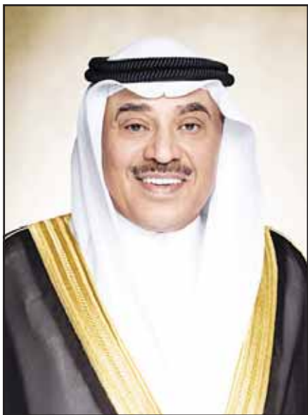
His Highness the Crown Prince Sheikh Sabah Khaled Al-Hamad Al-Sabah

His Highness the Amir lauded the outstanding efforts of the Saudi leadership and government institutions – especially the Ministry of Interior and other relevant sectors – for their dedicated service to pilgrims from around the world. He praised the continuous development of the holy sites and the integration of advanced technologies and smart services, which significantly contributed to facilitating the performance of Hajj rites.