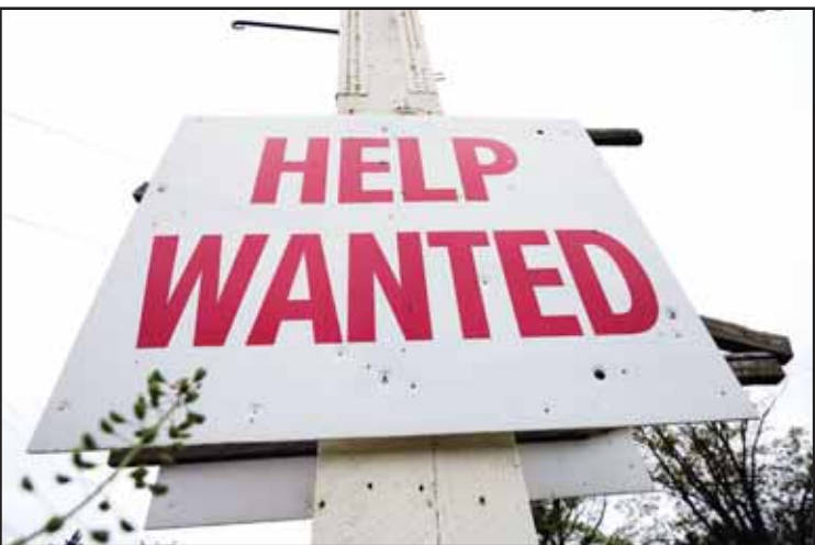
A help wanted sign is posted in Lansdale, Pa., Friday, April 28, 2023.

the Federal Reserve raised their benchmark interest rate 11 times in 2022 and 2023, the higher borrowing costs were widely expected to tip the United States into a recession. They didn't. Still, the job market has clearly decelerated. So far this year, American employers have added an average of less than 124,000 a month. That is down 26% from last year, down almost 43% from 2023, and down a whopping 67% compared with 2022. The modest job gains and steady unemployment rate are likely to keep the Fed on the sidelines for at least the next few months, economists said. The central bank Fed has kept its key short-term interest rate unchanged this year, after cutting it three times last year. Fed chair Jerome Powell and most other Fed policymakers have voiced concern that Trump's tariffs could push up inflation later this year, which they would seek to counter by raising rates. The Fed is only likely to accelerate interest rate cuts if the job market