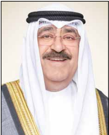
HH the Amir