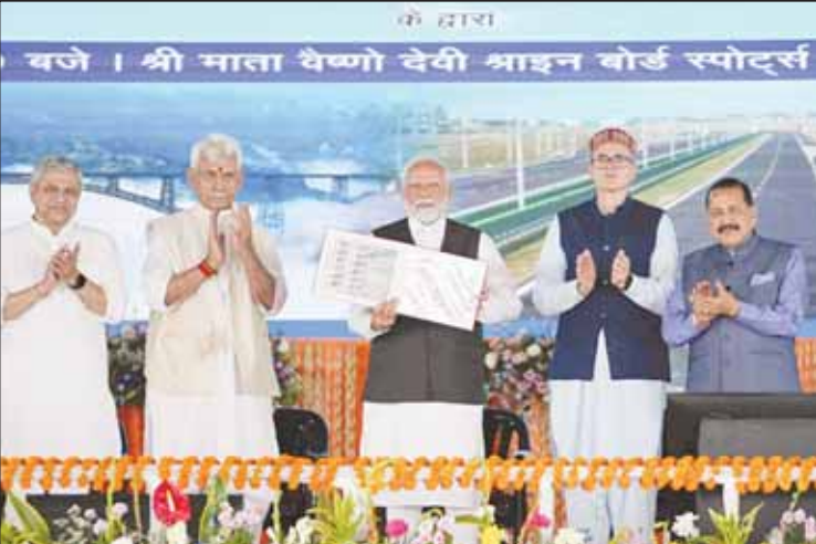
Indian Prime Minister Narendra Modi displays a postal ticket at a public rally after inaugurating Vande Bharat Express train which will run between Katra and Srinagar, in Katra, India on June 6.

of Canada, called Carney's invitation to Modi a "betrayal of Canadian values." "The summit to which Mr. Modi is being invited falls on the anniversary of the assassination of Hardeep Singh Nijjar two years ago," he said. "So for us, this is unacceptable, it's shocking and it's a complete reversal of the principled stand that Prime Minister Trudeau had taken." Canada is not the only country that has accused Indian officials of plotting an association on foreign soil. In 2023 US prosecutors said an Indian government official directed a failed plot to assassinate another Sikh separatist leader in New York.