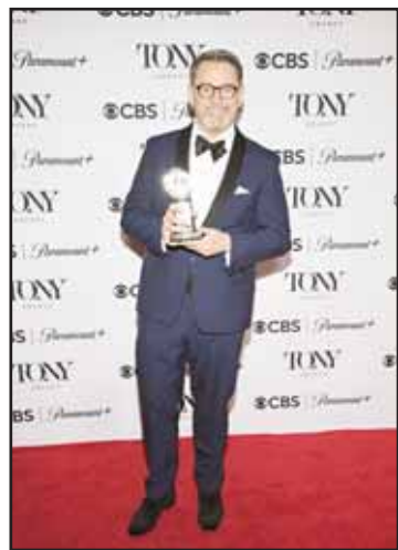
Michael Arden poses in the press room with award for best direction of a musical for 'Maybe Happy Ending' during the 78th Tony Awards on Sunday, June 8, at Radio City Music Hall in New York.