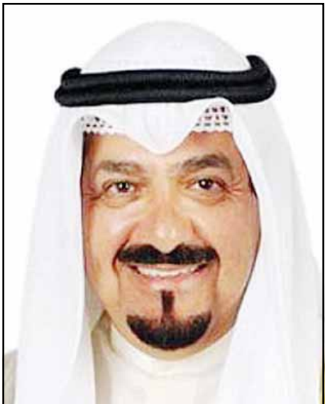
HH the Prime Minister