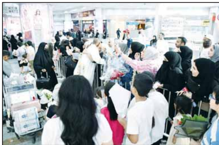
Joy and tears flow freely as pilgrims are embraced by loved ones in a heartfelt homecoming at Kuwait International Airport.

In statements to the newspaper, several pilgrims expressed their ap-