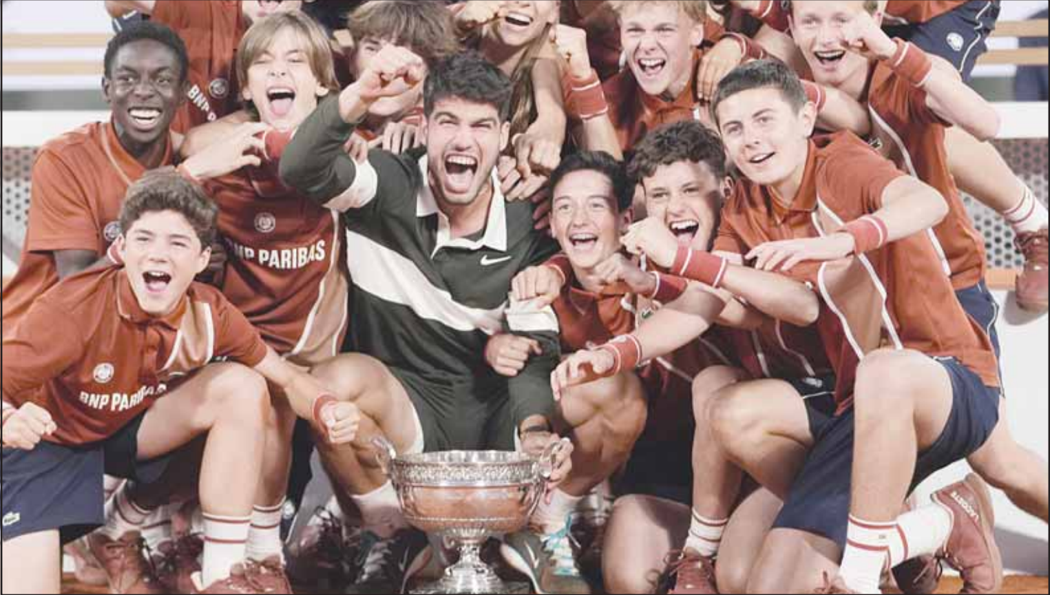
Spain's Carlos Alcaraz celebrates with ball boys and girls after winning the final match of the French Tennis Open against Italy's Jannik Sinner at the Roland-Garros Stadium in Paris.