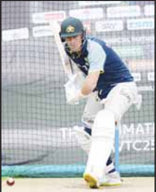
Australia's Marnus Labuschagne bats during a nets session at Lord's, London. (AP)

LONDON, June 9, (AP): When it comes to major cricket finals, Australia is in a league of its own. Only Australia has won all four men's global trophies. It is hard to beat in finals, having won 10 of 13 across the 50-over World Cup, 20-over World Cup, Champions Trophy, and World Test Championship. And let's not get started on the women's team, which is even more dominant. The men go for world title No. 11 from Wednesday in the WTC final against South Africa at neutral Lord's.