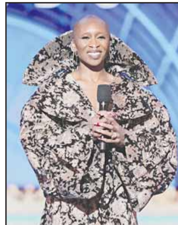
Host Cynthia Erivo speaks during the 78th Tony Awards, June 8, in New York.