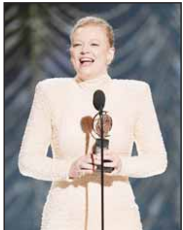
Sarah Snook wins the best leading actress in a play award for 'The Picture of Dorian Gray.'

"I don't feel alone any night that I do this show," Snook said, dismissing the idea of it as a one-woman show. "There are so many people onstage making it work and behind the stage