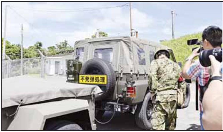
A Japan Self-Defence Forces vehicle enters an area of ammunition store in the town of Yomitanson, Okinawa prefecture, southern Japan on June 9. A yellow sign reads 'Bomb Disposal.'