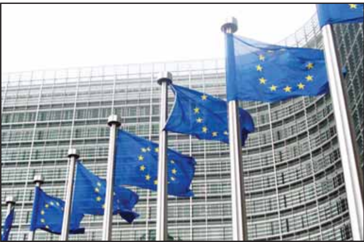
EU headquarters hoisting flags of member states.

BRUSSELS, June 9, (KUNA): Telecom ministers from across the European Union (EU) formally adopted on Friday the EU Cyber Blueprint for cyber crisis management, marking a significant step in how the bloc prepares for and responds to large-scale cybersecurity incidents. The newly endorsed framework provides clear guidance for coordinated detection, response, and recovery efforts across member states in the event of a major cyberattack or digital disruption that could affect critical infrastructure or services across the EU. The blueprint aims to streamline cooperation between national authorities, EU institutions, and private-sector partners, ensuring faster and more effective incident response. It also emphasizes the importance of learning from each crisis to improve resilience over time. The move reflects growing urgency among EU leaders to address cross-border cyber threats through unified action, especially as cyberattacks targeting energy, transport, health, and digital services continue to rise. The updated cybersecurity blueprint refines the comprehensive EU framework for Cybersecurity Crisis Management, detailing the roles of relevant EU actors throughout the entire crisis lifecycle. The EU Cyber Blueprint is an important guideline for member states to enhance their preparedness, detection capabilities, and response to cyberse-