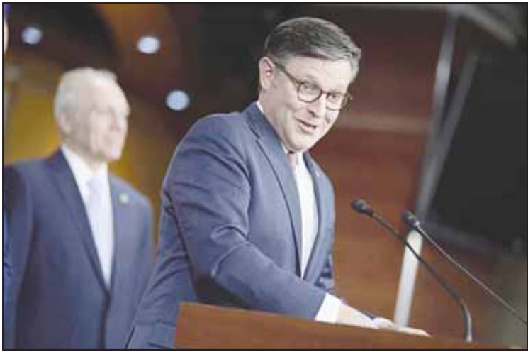
US Speaker of the House Mike Johnson, wraps up a news conference on President Donald Trump's bill of tax breaks and spending cuts, at the Capitol in Washington on June 4.

Johnson argued that Musk still believes "that our policies are better for human flourishing. They're better for the US economy. They're better for everything that he's involved in with his innovation and job creation and entrepreneurship." The speaker and other Republicans, including Trump's White House budget chief, continued their push back Sunday against forecasts that their tax and budget plans will add to annual deficits and thus balloon a national debt already climbing toward $40 trillion. Johnson insisted that Musk has bad information, and the speaker disputed the forecasts of the nonpartisan Congressional Budget Office that scores budget legislation. The bill would extend the 2017 Trump tax cuts, cut spending and reduce some other levies but also leave some 10.9 million more people without health insurance