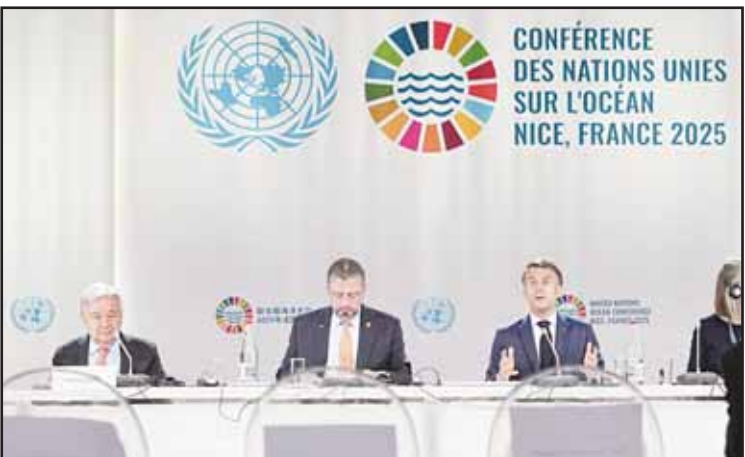
French President Emmanuel Macron, (right), speaks as he sits with Costa Rica’s President Rodrigo Chaves Robles, (center), and UN Secretary General Antonio Guterres during the opening of the third UN Ocean Conference in Nice, French Riviera, Monday, June 9.