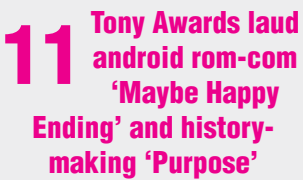
11 Tony Awards laud android rom-com 'Maybe Happy Ending' and history-making 'Purpose'