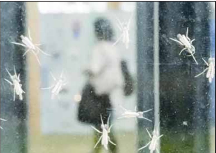
Chironomid midges are seen at the site of the World Exposition in Osaka, western Japan on May 21, 2025. (AP)

TOKYO, June 9, (AP): Popular daily fountain shows and a shallow pool area at Expo 2025 in Osaka have been temporarily suspended due to bacterial contamination that required cleaning and safety checks, the event organisers said on Monday. The aquatic show at the Water Plaza has been suspended since June 4 when legionella bacteria of up to 20 times the legal limit was detected in the water, a week after lower levels of contamination had been found. Another water area, called the Forest of Tranquility - a shallow reservoir over 2.3 hectares (5.7 acres) where visitors can soak their feet and relax - has also been closed for cleaning due to the legionella contamination, which can cause pneumonia. The bacteria contamination is the latest problem hitting the Expo site, where swarms of midges have been bothering visitors for weeks. The venue, built on a former industrial waste burial site in the Osaka Bay in western Japan, where methane gas was detected days before the opening in April. The use of insecticides have so far not effectively blocked the midges.