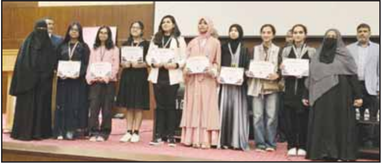
Students honored for academic excellence.