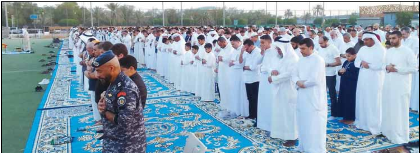
Kuwaitis and residents perform the early morning Eid prayers at one of the open areas designated by the Ministry of Islamic Affairs.

Kuwait’s Minister of Information and Culture Abdulrahman Al-Mutairi on Friday congratulated His Highness the Amir Sheikh Meshal Al-Ahmad Al-Jaber Al-Sabah, His Highness the Crown Prince Sheikh Sabah Khaled Al-Hamad Al-Sabah, His Highness the Prime Minister Sheikh Abdullah Al-Ahmad Al-Sabah, the gracious people of Kuwait and the Islamic nation on advent of Eid Al-Adha. In a statement to KUNA, the minister who was visiting the workers at the ministry’s divisions, lauded the personnel for