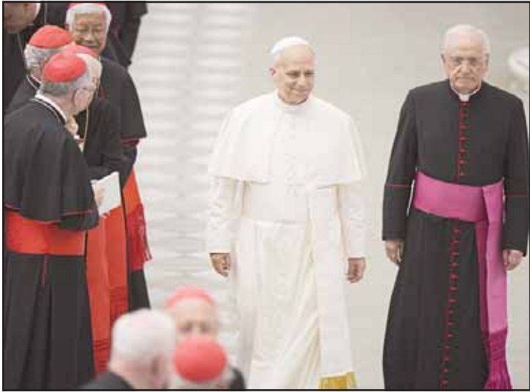
Pope Leo XIV arrives for a meditation on the occasion of the Jubilee of the Holy See in the Paul VI Hall at the Vatican on June 9. (AP)

VATICAN CITY, June 9, (AP): Pope Leo XIV criticized the surge of nationalist political movements in the world as he prayed Sunday for reconciliation and dialogue - a message in line with his pledges to make the Catholic Church a symbol of peace. The pope celebrated Sunday Mass in St. Peter's Square in front of tens of thousands faithful, and asked the Holy Spirit to "break down barriers and tear down the walls of indifference and hatred." "Where there is love, there is no room for prejudice, for 'security' zones separating us from our neighbors, for the exclusionary mindset that, tragically, we now see emerging also in political nationalisms," the first American pontiff said.