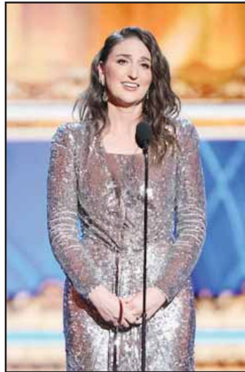
Sara Bareilles speaks during Act One of the 78th Tony Awards on Sunday.

a moving in memoriam, singing "The Sun Will Come Out" from "Annie," and honoring its composer Charles Strouse as well as George Wendt, Richard Chamberlain, Athol Fugard, Joan Plowright, Quincy Jones, Linda Lavin, James Earl Jones and Gavin Creel.