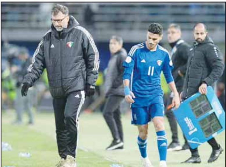
In this file photo, Kuwait head coach on the touch line to make a change.