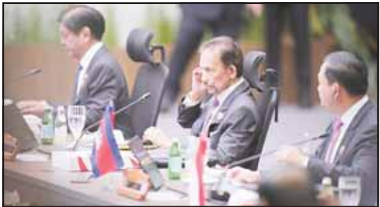
Brunei’s Sultan Hassanal Bolkiah, (center), attends the plenary session at the Association of Southeast Asian Nations (ASEAN) Summit in Kuala Lumpur, Malaysia, on May 26.