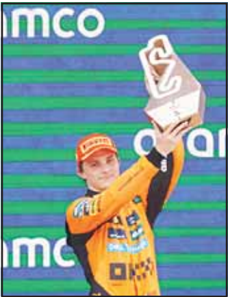
McLaren driver Oscar Piastrri of Australia celebrates after winning the Spanish Grand Prix Formula One race at the Barcelona Catalunya racetrack in Montmelo, near Barcelona, Spain.

five of those victories. “Very hard to complain. It has been a great year,” Piastrri said. “We executed everything we needed to. I am really enjoying it.” Piastrri has 186 points, ten more than Norris. Verstappen dropped to 49 points behind the leader. “I never said that I was in a championship fight,” Verstappen said. “First of all, I think every race so far it’s been tough. You know when they get their things right, they’re unbeatable. And I think that’s quite clear this season.” Verstappen’s run of three consecutive wins at the Circuit de Barcelona-Catalunya ended after he saw his Red Bull slowed on hard-compound tires that his team put on after a fourth pit stop following a late safety car. Before the safety car he was third, but after the restart couldn’t stop Leclerc and Russell, who both passed