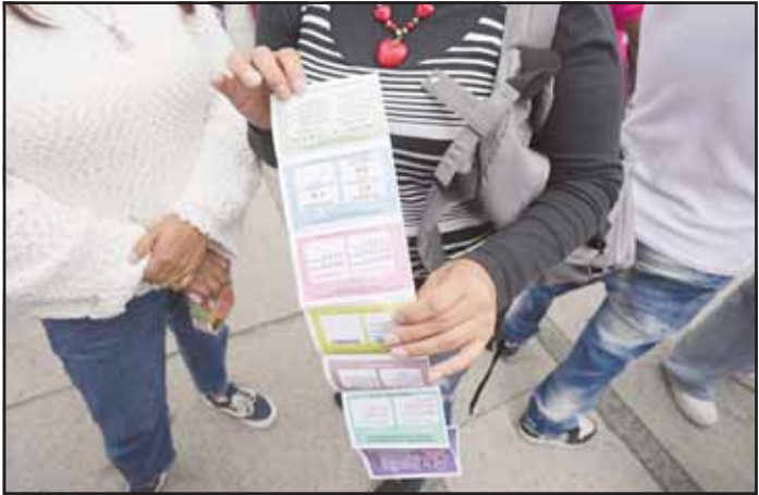
A supporter of Lenia Batres, who is running for election for the Mexican Supreme Court, holds an instruction sheet on how to vote, during her closing campaign rally in Mexico City on May 28.

Mexico President Claudia Sheinbaum and party allies have said the elections are a way to purge the court system of corruption in a country that has long faced high levels of impunity. Critics say the