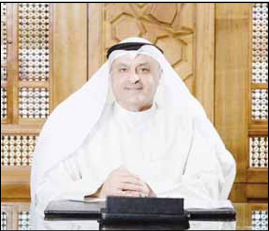
Secretary General of the Arab Energy Organization, Jamal Al-Loughani

be sought while considering the economic conditions and social justice in each concerned country. Addressing the issue from another perspective, Al-Loughani pointed out that concentration of rare raw materials in certain nations worldwide increases fears of disruption in the supply chains, geopolitical hazards, noting that China controls 80 percent of the rare minerals supply chains and 90 percent of the treatment potentials. Asserting the cautious bullish outlook with respect of electric cars' sales and the impact on the global oil demand, Al-Loughani said the demand would remain stable and might increase in developing countries that have been witnessing noticeable and rapid economic growth, along with population growth. Regarding the nuclear energy, he has stated that it is a strategic option that envisages major chances and complex challenges namely safety and security, such as sound and harmless waste treatment. Currently, there are 440 operating nuclear reactors in 32 states with an output capacity of 400 gigawatts and secure nine percent of the global power output. He called on the Arab states to study the foreign experience that affirms necessity of clear policies, effective investments and structures that match the technological development in nuclear energy. He has also noted in this regard that many states throughout the globe have been reviving or expanding