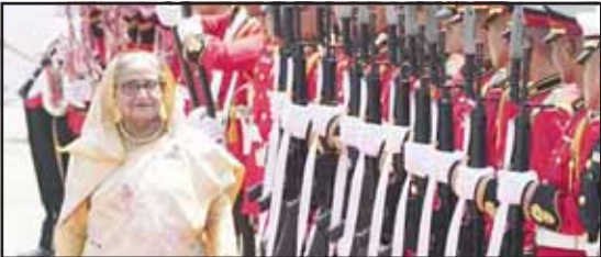
Bangladesh’s Prime Minister Sheikh Hasina reviews an honor guard during a welcome ceremony at the government house in Bangkok, Thailand on April 26, 2024.

Brunei’s government said on social media late Saturday that the 78-year-old monarch has moved to a Kuala Lumpur hotel, where he will spend a few days resting before returning home. Brunei’s information department posted pictures on Facebook of the sultan walking into the hotel lobby with his wife, and in a room with family members including his wife and two of his sons.