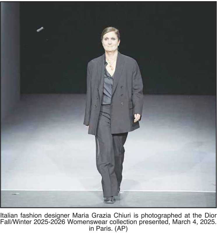
Italian fashion designer Maria Grazia Chiuri is photographed at the Dior Fall/Winter 2025-2026 Womenswear collection presented, March 4, 2025. in Paris.