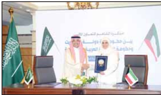
Kuwait's Minister of Finance Noura Al-Fassam formalizes key deals with Saudi, Qatari counterparts.