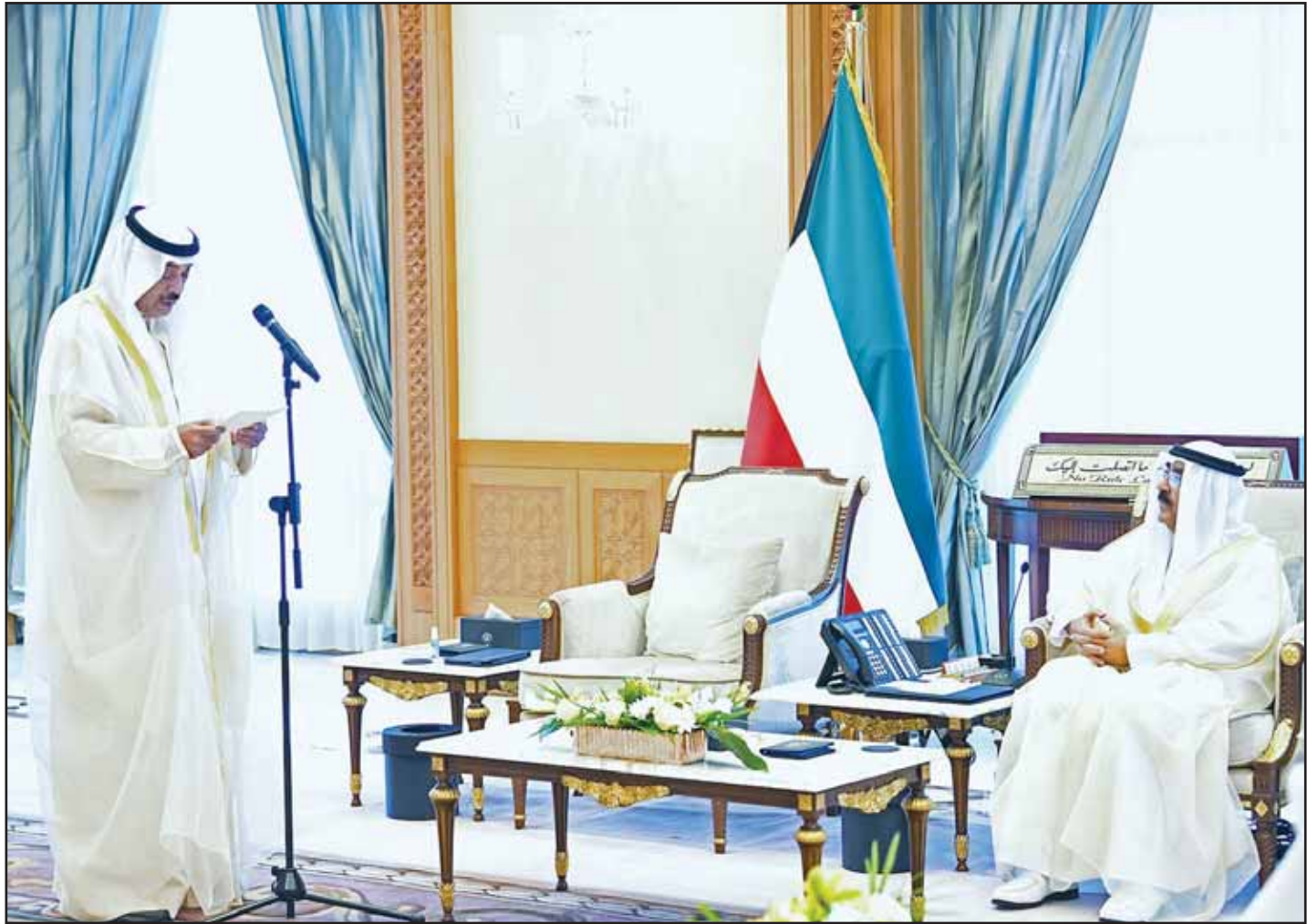
His Highness Sheikh Sabah Khaled Hamad Al-Sabah taking the oath.