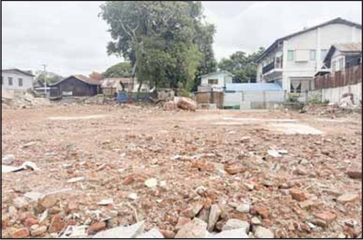
An empty field is seen after clear earthquake in Naypyitaw, Myanmar on May 23.

Senior Gen Min Aung Hlaing, the head of Myanmar’s military government, said at a Thursday fund-raising ceremony for disaster relief that