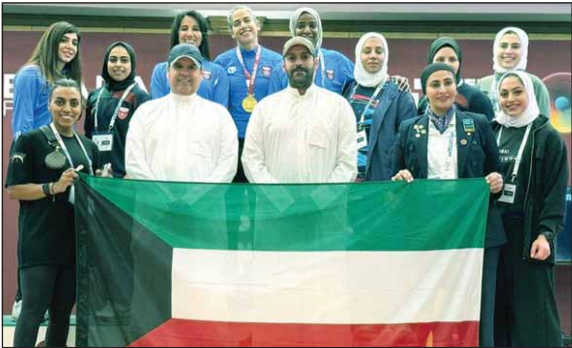
The champions celebrate with the national flag.