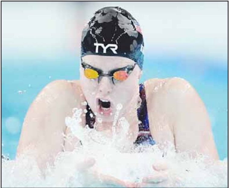
In this file photo, Lilly King, of the United States, competes in the women’s 100-meter breaststroke semifinal at the 2024 Summer Olympics in Nanterre, France.

ARLINGTON, Texas, June 1, Ariel Atkins scored 26 points, Angel Reese had 14 points and nine rebounds, and the Chicago Sky beat the short-handed Dallas Wings 94-83 on Saturday night for the second time in three days. Dallas rookie Paige Bueckers did not play after being placed in the WNBA’s concussion protocol. The Wings said Friday that Bueckers, the No. 1 overall pick in this year’s draft out of UConn, was in concussion protocol after their 97-92 loss at Chicago on Thursday night. Courtney Vandersloot had 15 points, seven rebounds and seven assists for Chicago (2-4). Kia Nurse added 11 points. NaLyssa Smith led Dallas (1-6) with 20 points. DiJonai Carrington scored 16 and Arike Ogunbowale added 15 points on 5-of-16 shooting. Atkins scored 14 points in the first half to help Chicago build a 46-43 lead. The Sky shot just 39% from the field, including 4 of 14 from 3-point range, but hit 10 of 11 free throws. Smith led the Wings with 13 points. The teams combined to go 51 of 65 at the free-throw line, with Chicago making 26. The Sky also made eight 3-pointers compared to just four for Dallas. Dallas lost for the 25th straight time in games scoring 84 points or fewer.