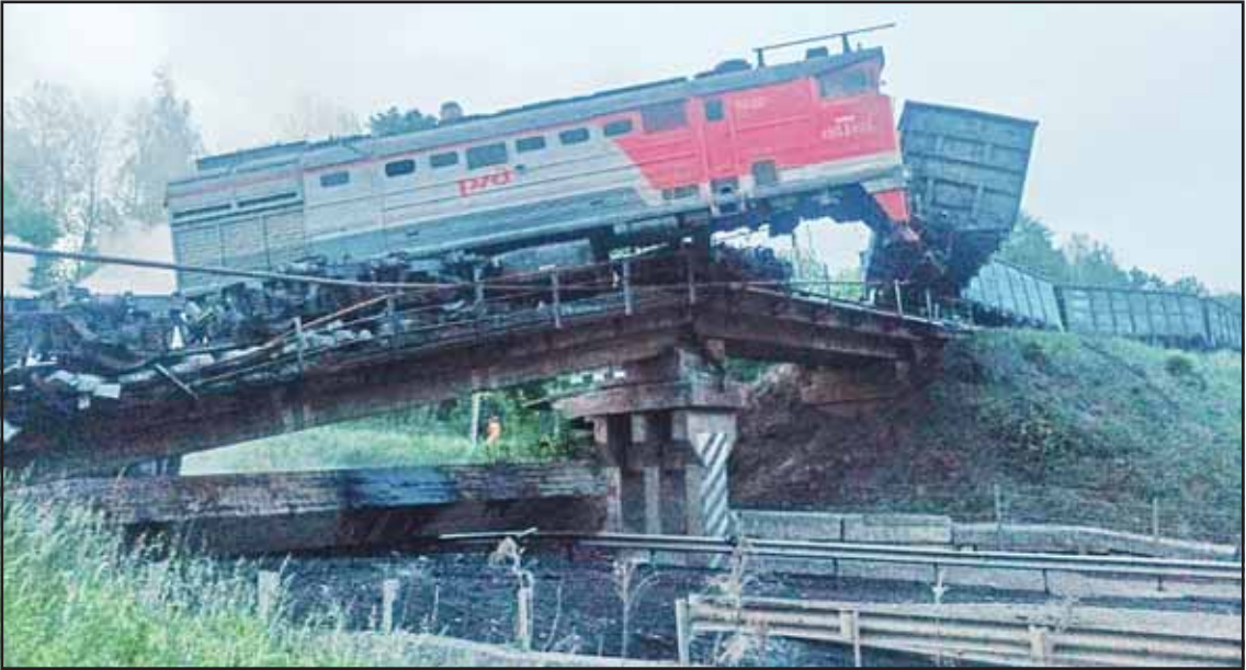
This photo released by Acting Governor of the Kursk Region Alexander Khinshtein's telegram channel on June 1, shows a view of a damaged bridge after the crash of a freight train in Russia's Kursk region, which borders Ukraine.