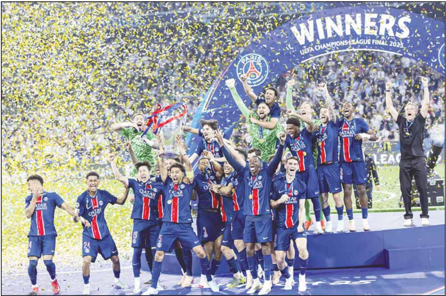
PSG's captain Marquinhos celebrates with Champions League trophy after the Champions League final soccer match between Paris Saint Germain and Inter Milan, at the Allianz Arena in Munich, Germany.

turnover or merchandizing but on the merits of its achievements on the field. The Champions League is the ultimate barometer of the continent's elite clubs, and up until now, PSG has been a flashy contender that always came up short. That all changed at Allianz Arena,