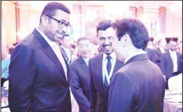
Kuwait’s Minister of Defense Sheikh Abdullah Ali Abdullah Al-Sabah meets heads of state, and senior officials.

KUALA LUMPUR, June 1, (KUNA): Kuwait’s Minister of Defense Sheikh Abdullah Ali Abdullah Al-Sabah met Singapore’s Coordinating Minister for National Security and Minister of Home Affairs K. Shanmugam on Saturday to discuss the prospects of enhancing the security cooperation.