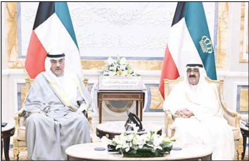
HH the Amir receives HH the Crown Prince.