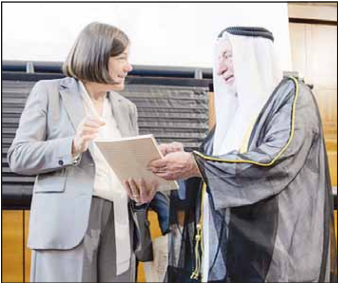
Sharjah ruler gifts University of Sacred Heart historical manuscript.

necessary funds from the churches.” His Highness the Ruler of Sharjah explained that he translated and studied this decree, tracking the funds collected through the churches, which amounted to two hundred thousand cruzados, a Portuguese gold currency at the time. The goal was to build a fleet and send it to India to retake Hormuz. His Highness noted that the fleet required a special type of large ship capable of crossing oceans, which would take considerable time, along with a sailing journey from Portugal to India that would last several months. His Highness indicated that King Philip ordered the funds to be sent to India to build a local fleet there, due to the short distance between India and Hormuz. He explained that the details of this fleet and its armament are mentioned in the book “Papal Bull” that he authored, as well as the account of its journey to the battle site in Hormuz against the English and Dutch forces, culminating in the defeat of the Portuguese fleet.