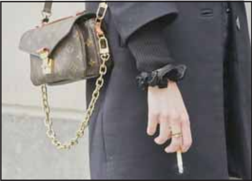
A woman holds a cigarette during a break in Paris, Wednesday, May 28, 2025.