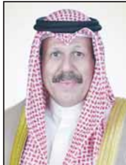
Sheikh Faisal Nawaf