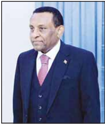
Kamil Idris attends the swearing-in ceremony in Port Sudan, eastern Sudan on May 31.

The decision was welcomed by the United Nations, the African Union Commission, and the Intergovernmental Authority on Development (IGAD). The prime minister’s post had remained vacant since the resignation of Abdalla Hamdok in January 2022, following a military coup led by Burhan in October 2021. Hamdok and other civilian leaders were briefly detained before being reinstated under a short-lived power-sharing deal. He stepped down weeks later, warning that Sudan was at a “dangerous turning point” as mass protests erupted against military rule. Idris, who holds a doctoral degree in international law, previously served as Director General of the World Intellectual Property Or-