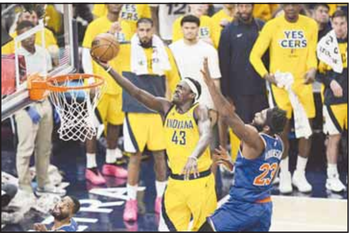
Indiana Pacers forward Pascal Siakam (43) shoots against New York Knicks center Mitchell Robinson (23) during the first half of Game 6 of the Eastern Conference finals of the NBA basketball playoffs in Indianapolis, Saturday, May 31, 2025.

INDIANAPOLIS, June 1, Pascal Siakam and Tyrese Haliburton made sure the Indiana Pacers gave their fans a celebration they waited 25 years to see again. Siakam had 31 points, and Haliburton scored 11 of his 21 points in the fourth quarter, carrying the Pacers to a 125-108 victory over the New York Knicks on Saturday night for a 4-2 series win and their first trip to the NBA Finals since 2000. It’s just the second time in franchise history that they’ll play for the championship. The series begins on Thursday in Oklahoma City. “Pascal and Tyrese put us on their backs and made sure we would not lose,” coach Rick Carlisle told the gold-clad crowd that was on its feet for the waning minutes and the postgame party. “But our work has just begun.” Siakam won the Larry Bird Trophy as the Eastern Conference finals MVP. Bird is the only other coach to take the Pacers to the Finals. Haliburton finished with 13 assists, and Obi Toppin added 18 points and six rebounds against his former team. OG Anunoby led the Knicks with