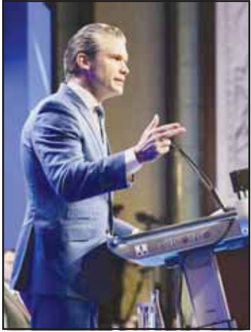
US Defense Secretary Pete Hegseth delivers his speech during 22nd Shangri-La Dialogue summit in Singapore on May 31.

The spokesperson said that no country in the world deserves to be called a hegemonic power other than the United States itself, who is also the primary factor undermining the peace and stability in the Asia-Pacific. To perpetuate its hegemony and advance the so-called “Indo-Pacific strategy,” the United States has deployed offen-