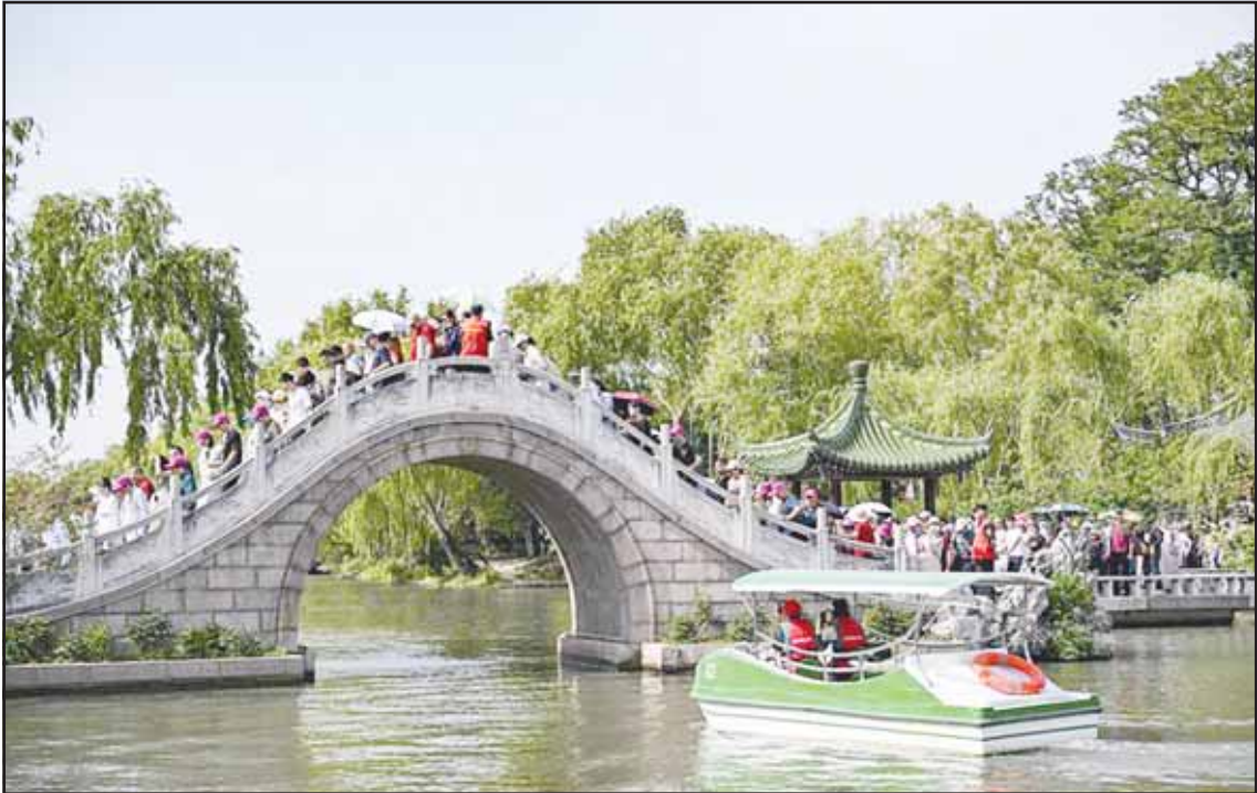
Tourists visit the Slender West Lake scenic spot in Yangzhou, east China’s Jiangsu Province on May 19. As one of the famous ancient cities of China, Yangzhou has a history of over 2,500 years. It is making full use of the cultural tourism resources of the Grand Canal, exploring new scenes and formats, and creating cultural tourism projects for night tours of the canal to inject new vitality into the ancient city. The Grand Canal connects Beijing and Hangzhou in east China’s Zhejiang Province, serving as a significant transportation artery in ancient China. An over 1,000-km-stretch of the canal was declared a World Heritage site in 2014.

“On the South China Sea, there has never been any problem with regard to freedom of navigation and overflight there,” the spokesperson said, adding China has always been committed to working with countries concerned to properly handle differences through dialogue and consultation, while safeguarding China’s territorial sovereignty and maritime rights and interests in accordance with laws and regulations. “It is the United States who is the primary factor that is hurting the peace and stability in the South China Sea,” said the spokesperson.