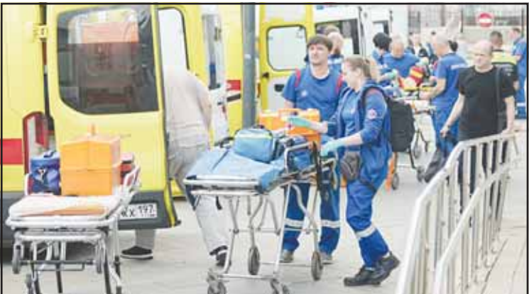
Emergency medics wait for arrival of wounded passengers at the railway station in Moscow, Russia on June 1, after a road bridge collapsed on top of a passenger train in the Bryansk region, located on Russia's border with Ukraine.