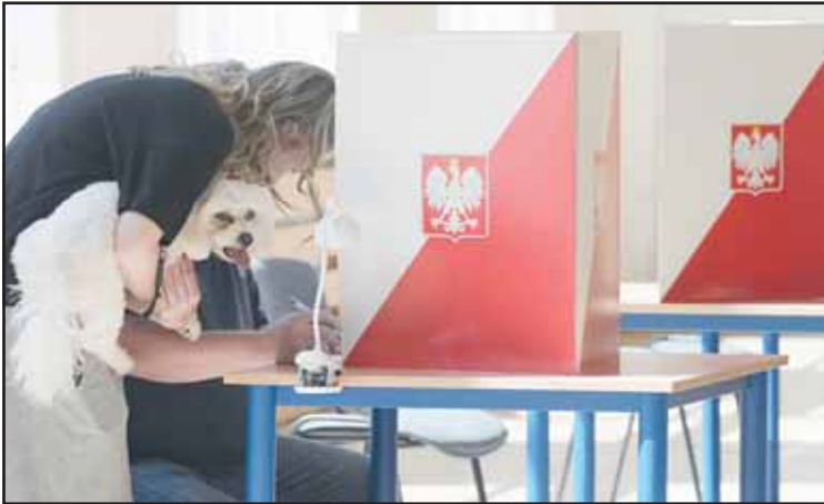
People prepare to vote during the presidential election runoff in Warsaw, Poland on June 1.