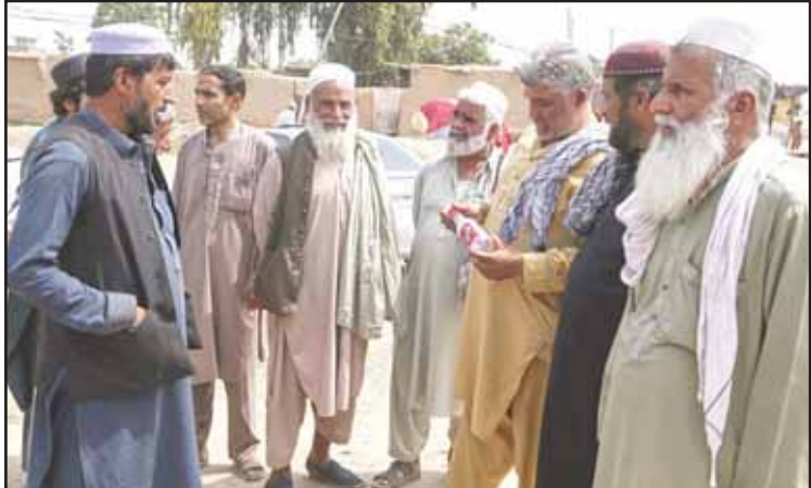
Afghan refugees discuss the situation following Pakistan government plan to expel them at Kababayan Refugee Camp in Peshawar, Pakistan on April 8.

KABUL: A total of 500,000 Afghan refugees have returned to their homeland Afghanistan from neighboring Pakistan and Iran in April and May, according to the United Nations High Commissioner for Refugees (UN-