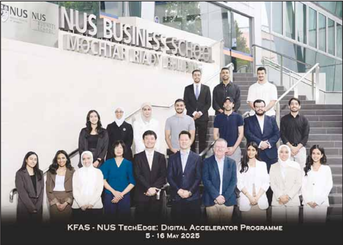
Tech Edge program