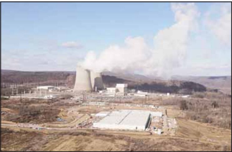
A data center owned by Amazon Web Services, front right, is under construction next to the Susquehanna nuclear power plant in Berwick, Pa., on Jan 14, 2024.