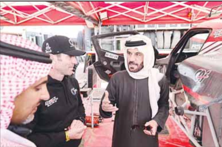
FIA President Mohammed Ben Sulayem tells MENA members club: Together, we will continue to shape a stronger, more dynamic FIA.