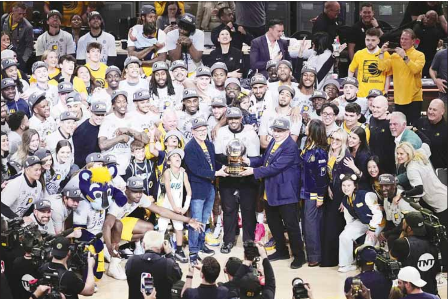
The Indiana Pacers celebrate after winning Game 6 of the Eastern Conference finals of the NBA basketball playoffs against the New York Knicks in Indianapolis.