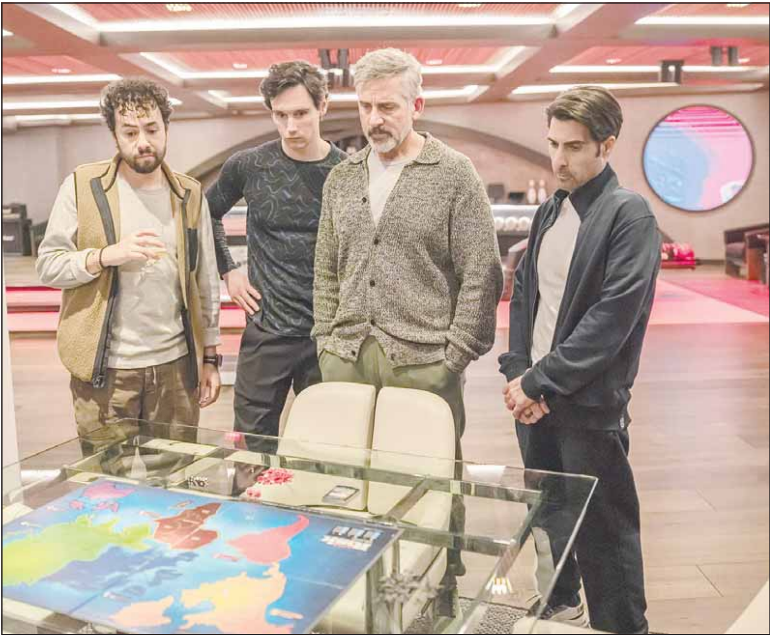
This image released by Max shows, (from left), Ramy Youssef, Cory Michael Smith, Steve Carell and Jason Schwartzman in a scene from 'Mountainhead.'