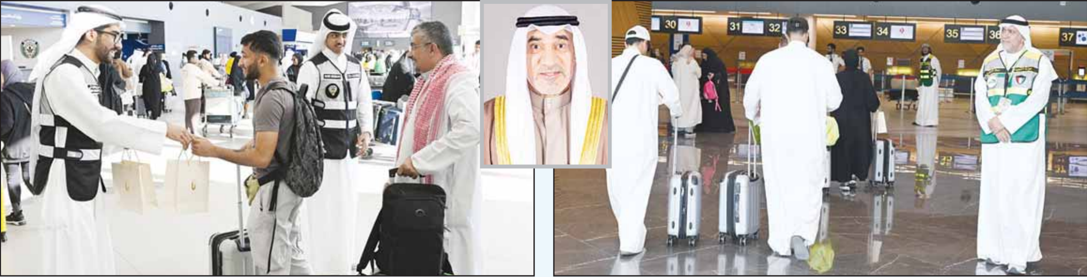
Kuwaiti pilgrims offered gifts as they leave for Hajj pilgrimage (right). Inset: Sheikh Fahad Al-Yousef