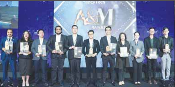
The recipients of the AI marketing ecosystem partner category honors at the FancyTech A&M Awards 2025

The A&M Awards served as both a celebration of what’s possible and a preview of what’s next in the region’s marketing evolution.