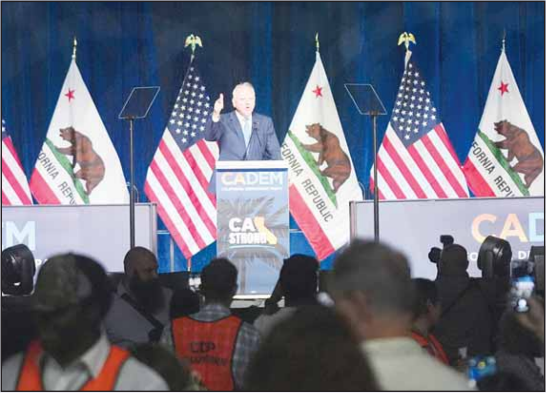
Minnesota Gov Tim Walz speaks at the California Democratic Party's 2025 State Convention at the Anaheim Convention Center in Anaheim, California, May 31.