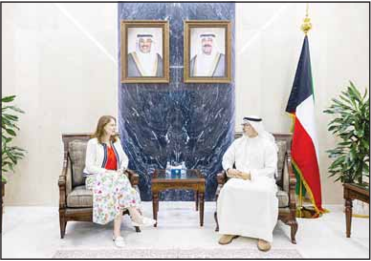
Kuwait's Deputy FM receives UK Ambassador to Kuwait.