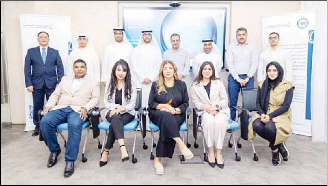
Participants pose for a group photo.

KUWAIT CITY, June 1: In today's evolving investment landscape, fund administration is no longer limited to accounting or compliance tasks — it has become a critical pillar of financial institutions' strategic infrastructure. It requires an integrated skill set combining accounting precision, regulatory compliance, and adaptability in serving investors. In alignment with this vision, the Investment Studies Center, the training arm of the Union of Investment Companies (UIC), organized a specialized training program titled "Fund Administration Functions", held on Thursday, 29th May 2025, at the UIC premises. This program serves as a practical and intensive reference that covers the core pillars of fund administration operations — from accounting and financial reporting, through investor servicing, to audit readiness and managing complex legal structures such as Special Purpose Vehicles (SPVs) and Carried Interest Vehicles. What Sets This Program Apart? Rather than relying on theoretical lectures, the program emphasizes practical exercises and interactive discussions, allowing participants to explore real-world scenarios and apply relevant tools and solutions in their work environments. Through its four