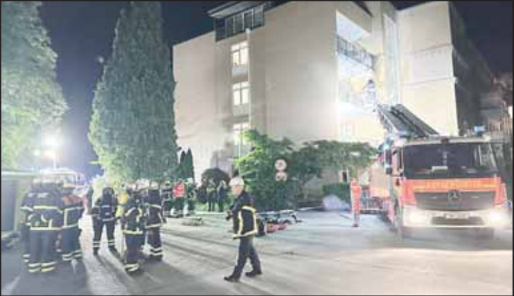
Firefighters with breathing apparatus and a ladder truck work at the Marienkrankenhaus hospital in Hamburg's Hohenfelde district, Germany on June 1.