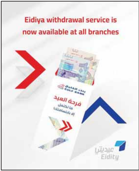
Gulf Bank offering ‘Ayadi’ service.

In alignment with Kuwait Vision 2035, “New Kuwait,” and its commitment to fostering collaborative partnerships,