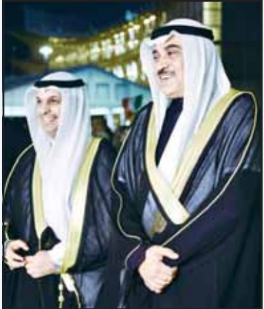
Crown Prince Diwan photos Photos during the visit of His Highness the Crown Prince Sheikh Sabah Khaled Al-Hamad Al-Sabah to Kuwaiti Pavilion at Expo Osaka 2025 on Friday.

OSAKA, May 31, (KUNA): Minister of Information, Culture, and Minister of State for Youth Affairs Abdulrahman Al-Mutairi expressed pride and honor for the visit of His Highness the Crown Prince Sheikh Sabah Khaled Al-Hamad Al-Sabah to Kuwaiti Pavilion at Expo Osaka 2025 on Friday.