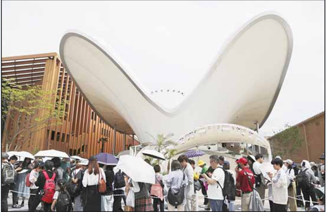
Crowds flock to the Kuwait Pavilion at Expo Osaka 2025, drawn by its rich showcase of heritage, innovation, and interactive exhibits.