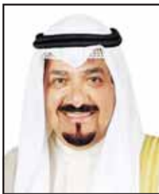
HH the Prime Minister