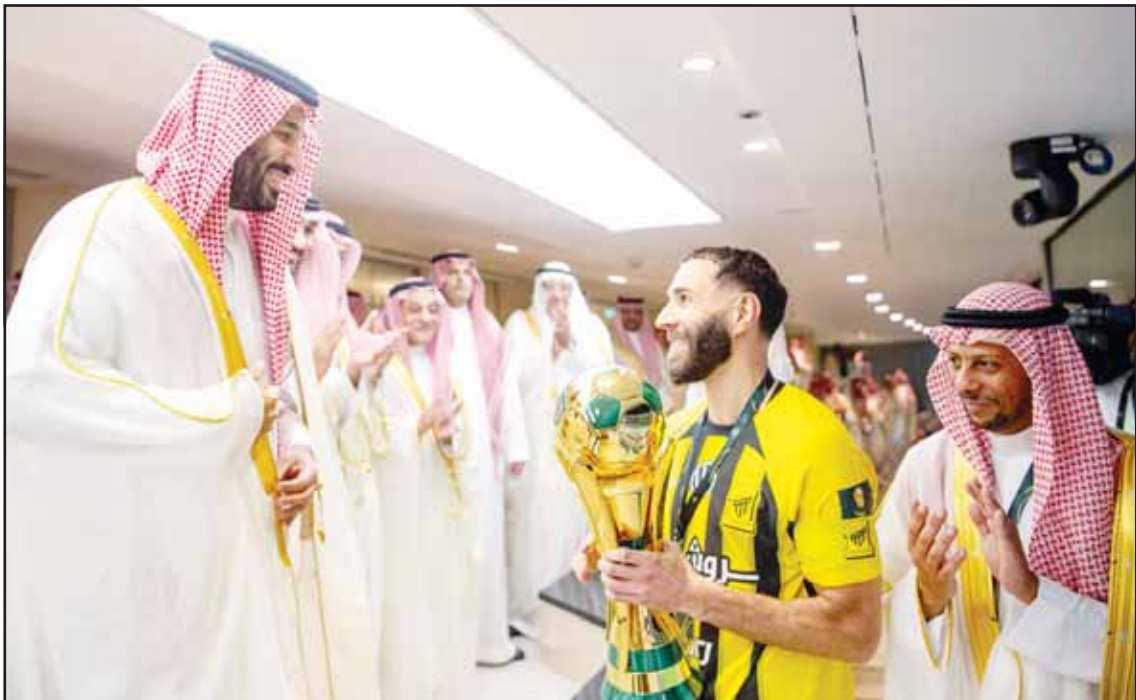
Prince Mohammed bin Salman hands over the King’s Cup to Al-Ittihad skipper Karim Benzema.