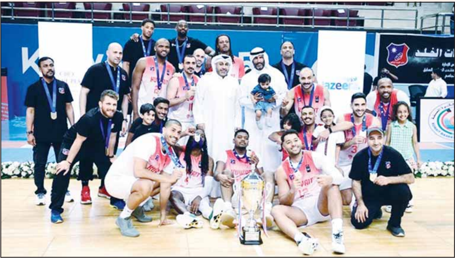
Players celebrate with officials.