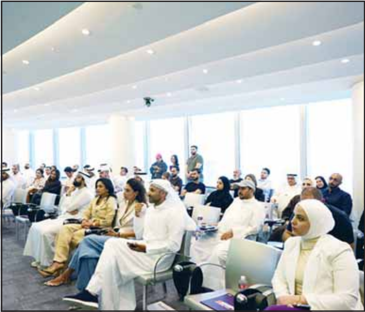
A large turnout of interested entrepreneurs.

KUWAIT CITY, May 31: Kuwait Telecommunications Company — stc, a world-class digital leader providing innovative services and platforms to customers, enabling the digital transformation in Kuwait, sponsored an event titled “The Future of F&B Marketing” as part of its strategic partnership with ordable, optimize and Snapchat to empower entrepreneurs operating within the F&B sector. The initiative included an interactive workshop delivered by Snapchat and comes under stc’s ‘weyak’ program, which aims to support SMEs in their unique journeys to enhance and grow their operations. The two-hour workshop was held at the Chairman’s Club in KIPCO Tower and welcomed over 50 entrepreneurs. The session was delivered by Snapchat’s MENA region account managers, who introduced attendees to a range of the platform’s marketing tools and features. Participants were given a hands-on walkthrough of how to effectively reach and engage audiences on Snapchat, with a focus on content strategy, Ad creation, and performance measurement tailored for businesses in the F&B space. Through this initiative, as well as other programs launched under the ‘weyak’ umbrella, stc aims to showcase its ongoing support to both SMEs and entrepreneurs in Kuwait. The Company focuses on introducing opportunities that enable SMEs to grow their operations and enhance their exposure in the market through leading platforms. The ‘weyak’ ini-