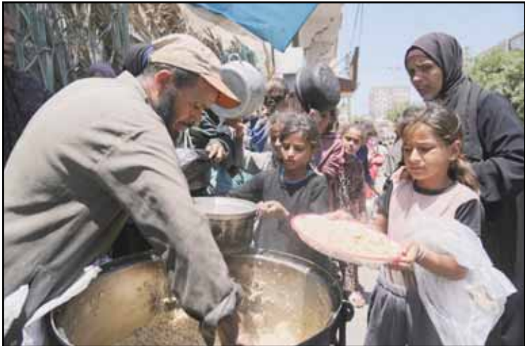
Palestinian children get food at a food distribution kitchen in Deir al-Balah, Gaza Strip, Friday, May 30.

GENEVA, May 31, (Agencies): For months, UN officials, aid groups and experts have warned that Palestinians in Gaza are on the brink of famine. Earlier this month, Israel eased a weekslong blockade on the territory as a result of international criticism, but the UN humanitarian aid office said Friday that deliveries into Gaza remain severely restricted, describing the current flow of food as a trickle into an area facing catastrophic levels of hunger. Gaza’s population of more than 2 million people relies almost entirely on outside aid to survive because Israel’s 19-month-old military offensive has wiped out most capacity to produce food inside the territory. Israel said it imposed the blockade to pressure Hamas into releasing the hostages it holds and because it accuses Hamas of siphoning off aid, without providing evidence. The U.N. says there are mechanisms in place that prevent any significant diversion of aid, though aid trucks have been robbed and hungry crowds have broken into aid warehouses a few times. No famine has been formally declared in Gaza. Here’s a look at what famine means and how the world finds out when one