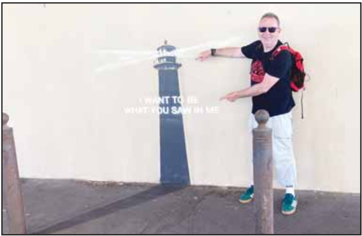
A man poses by an artwork by street artist Banksy, Friday, May 30, in Marseille, southern France.

MARSEILLE, France, May 31, — The lighthouse appeared overnight. Painted on a wall tucked away in a quiet Marseille street, its beam aligned perfectly with the real-life shadow of a metal post on the pavement. At its center, stenciled in crisp white, are the words: “I want to be what you saw in me.” Banksy had struck again. On Friday, the elusive British street artist confirmed the work by posting two images on his official Instagram account — without caption or coordinates. Fans quickly identified the location as 1 Rue Félix Frégier, in the Catalans district of Marseille’s 7th arrondissement, near the sea. Since then, crowds had gathered at the site. Tourists snap photos. Children point. Locals who usually walk past the building stop to take a closer look. There is no official explanation for the phrase. But its emotional pull is unmistakable — a quiet plea for recognition, love or redemption. Some speculate it references a country ballad by Lonestar. Others call it a love letter. Or a lament. Or both.