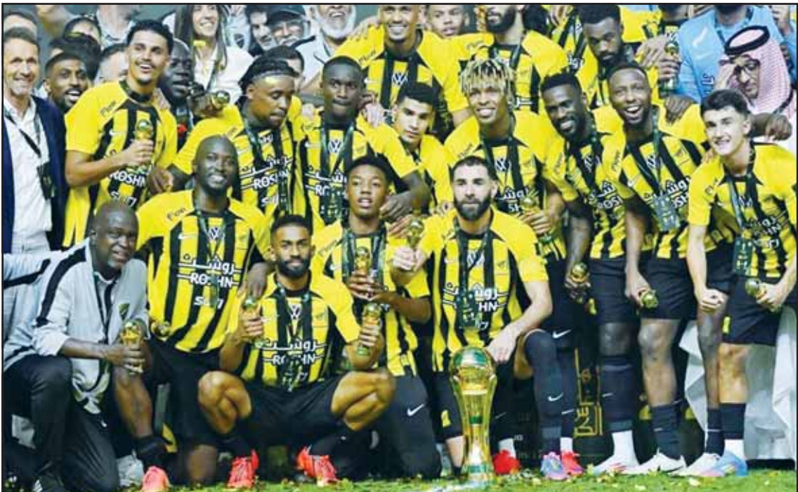
Al-Ittihad players led by Benzema celebrate after the awarding ceremony.