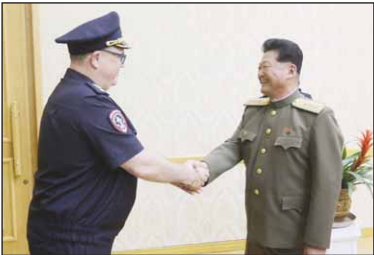
North Korean Public Security Minister Pang Tu Sop, (right), meets with Russian Vice Interior Minister Vitaly Shulika at the Mansudae Assembly Hall in Pyongyang, North Korea on May 28.