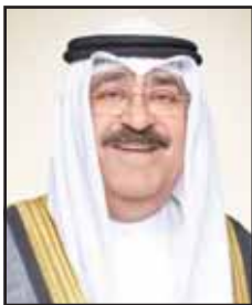
HH the Amir

He said the council approved the accreditation proposal for four academic programs in the College of Life Sciences, promoting 19 faculty members to the rank of professor and associate professor in the practical and humanities colleges.