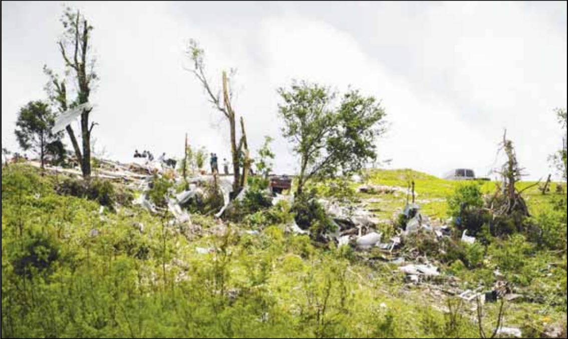
Debris and heavy damage are seen from severe weather on May 30, in Springfield, Ky. (AP)

orange moving northwest to south-east across Wisconsin. Most of the state showed moderate air quality as did all of Michigan’s Upper Peninsula. Eastern Iowa and northwestern Illinois also showed moderate air quality on the AirNow map. (AP)