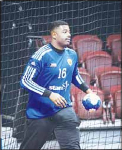
Kuwait U-19 handball team goalkeeper training for the championship.