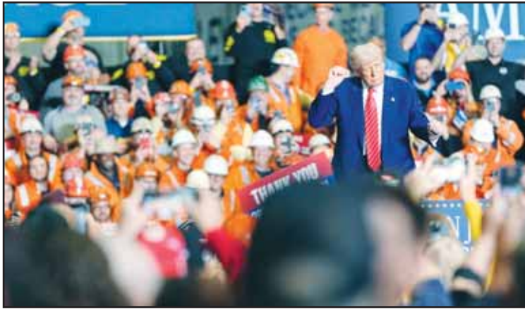
US President Donald Trump dances after speaking at U.S. Steel Corporation’s Mon Valley Works-Irvin Plant, Friday, May 30, 2025, in West Mifflin, Pa.

ried American company stays an American company,” Trump said as he opened an event at one of U.S. Steel’s warehouses. “You’re going to stay an American company, you know that, right?”