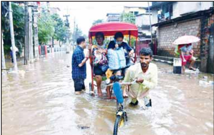
Residents cross a flooded street on a cycle rickshaw after heavy rains in Guwahati, India on May 31. (AP)

GUWAHATI, India, May 31, (AP): Landslides and flash flooding triggered by days of torrential monsoon rains in India's northeast have killed at least 22 people, officials said Saturday. Five people, including three from a single family, were killed on Saturday when their homes were buried in a mudslide in Assam state's Guwahati city, an official flood bulletin said. In neighbouring Arunachal Pradesh state, which borders China, seven people were killed on Friday when their vehicle was swept away by floodwaters. Two others drowned in a separate incident in the state. Eight people were killed in the states of Mizoram, Tripura and Meghalaya in the last 24 hours due to floods and mudslides brought on by the rains, according to official figures. Meanwhile in Assam, authorities disconnected the electricity in several areas to reduce the risk of electrocution, state Chief Minister Himanta Biswa Sarma said. Heavy rains also led to flooding in many urban areas