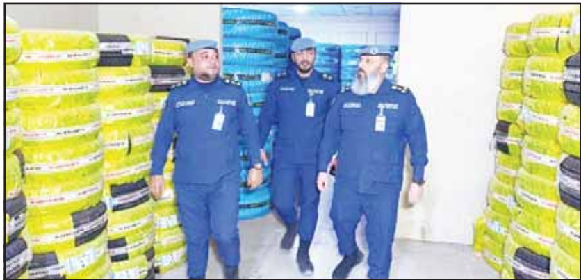
KFF personnel checking a tyre store in Shuwaikh shop.

In another development, the Public Relations Department of Kuwait Municipality announced that a recent campaign by the Safety Department's inspection team in Ahmadi Governorate resulted in the issuance of 193 warnings for non-compliance with safety regulations in the Sabah Al-Ahmad Marine area, reports Al-Seyassah daily.