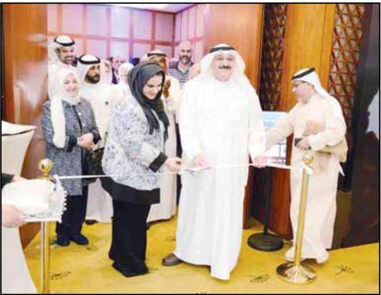
Kuwait Health Minister opens an exhibition accompanying the conference.

The outbreak was detected during a follow-up inspection in April to a 2024 outbreak that sickened 551 people and led to 155 hospitalizations in 34 states and Washington, D.C. In that outbreak, investigators found salmonella bacteria linked to many of the illnesses in untreated canal water used at farms operated by Bedner Growers and Thomas Produce Company. As part of the new investigation, FDA officials found salmonella in a sample of Bedner Growers cucumbers at a distribution center in Pennsylvania. That sample matched the strain of salmonella that made people sick. In addition, “multiple other strains” of salmonella were detected that “match samples in a government database. CDC officials are working to determine whether additional illnesses in people match those strains. Symptoms of salmonella poisoning include diarrhea, fever, severe vomiting, dehydration and stomach cramps. Most people who get sick recover within a week. Infections can be severe in young children, older adults and people with weakened immune systems, who may require hospitalization.