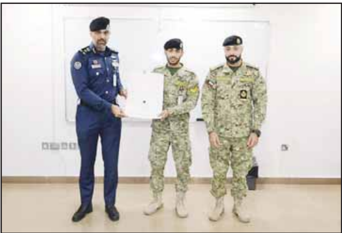
Kuwait National Guard officers being presented certificates by KFF personnel.

The Public Relations and Media Department had previously provided the association with specialized fire prevention materials printed in Braille, which were distributed to beneficiaries. These efforts contributed to enhancing preventive awareness and delivering safety messages tailored to the needs of this group.