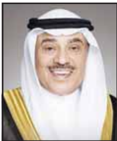
HH the Crown Prince