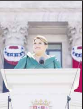
Jenniffer Gonzalez speaks after she was sworn in as governor outside the Capitol in San Juan, Puerto Rico on Jan 2.