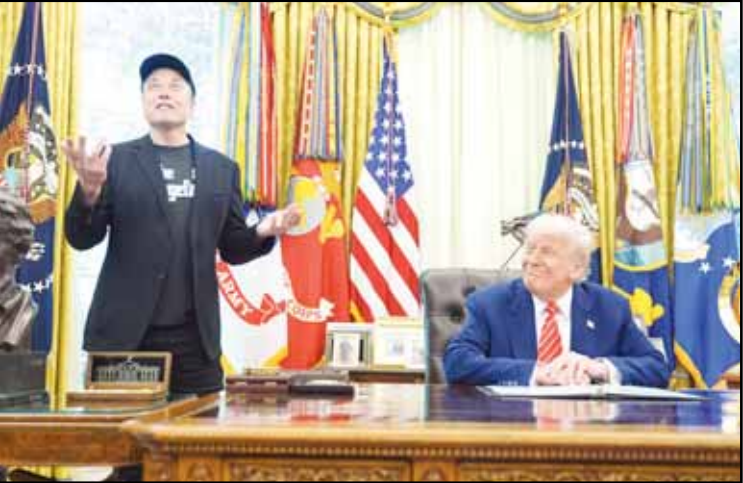
Elon Musk speaks during a news conference with President Donald Trump in the Oval Office of the White House, on May 30, in Washington.

WASHINGTON, May 31, US President Donald Trump bid farewell to Elon Musk in the Oval Office on Friday, providing a cordial conclusion to a tumultuous tenure for the billionaire entrepreneur. Musk is leaving his position spearheading the Department of Government Efficiency, and he’ll be rededicating himself to running his businesses, including electric automaker Tesla, rocket company SpaceX and social media platform X. Trump credited Musk with “a colossal change in the old ways of doing business in Washington” and said some of his staff would remain in the administration. Musk, who wore all black, including a T-shirt that said “The Dogefather,” nodded along as the president listed contracts that had been cut under his watch. “I think the DOGE team is doing an incredible job,” Musk said after accepting a ceremonial key from the president. “They’re going to continue to be doing an incredible job.” He left a searing mark on the federal bureaucracy, including thousands of employees who were fired or pushed out. Some government functions were eviscerated, such as the U.S. Agency