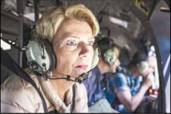
Swiss federal president Karin Keller-Sutter observes from a helicopter the damage caused by the catastrophic landslide destroying the village of Blatten, Switzerland, on May 30.

lages downstream from Blatten that could face flooding if the Lonza’s welled-up waters break through the pileup of mud. “We don’t want anybody else to go missing,” he said. “We will put no person in danger on the ground: No police officer, no soldier, no specialist, no member of civil security or fire squads.” He added: “Someone asked me before: ‘Who’s the chief in charge here?’ And I replied, there’s only one chief: nature.”