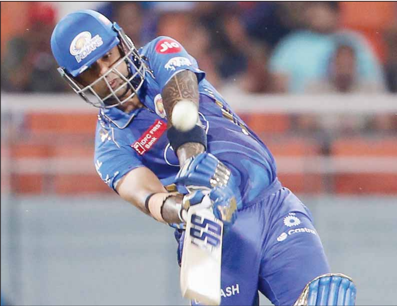
Mumbai Indians' Suryakumar Yadav plays a shot during the Indian Premier League eliminator cricket match between Mumbai Indians and Gujarat Titans at Maharaja Yadavindra Singh Cricket Stadium in Mohali, India.

NEW CHANDIGARH, India, May 31, Fast bowler Jasprit Bumrah provided the turning point as Mumbai Indians beat Gujarat Titans by 20 runs to advance in the Indian Premier League knockouts. Bumrah took a miserly 1-27 in four overs, the one wicket being Washington Sundar in the 14th over to end his and Sai Sudharsan's 84-run, 44-ball partnership. Sundar scored 48 off 24. Sudharsan led Gujarat's chase of 229 with 80 off 49 balls but he was bowled by Richard Gleeson in the 16th over and the pressure was too much. Gujarat finished at 208-6 in reply to Mumbai's 228-5, highlighted by Rohit Sharma's 81 off 50 balls. Record five-time champion Mumbai will play Punjab Kings on Sunday in Ahmedabad to decide who will face Royal Challengers Bengaluru in the final. Opting to bat, Mumbai set an attacking tempo in the powerplay and the openers benefitted from sloppy Gujarat fielding.