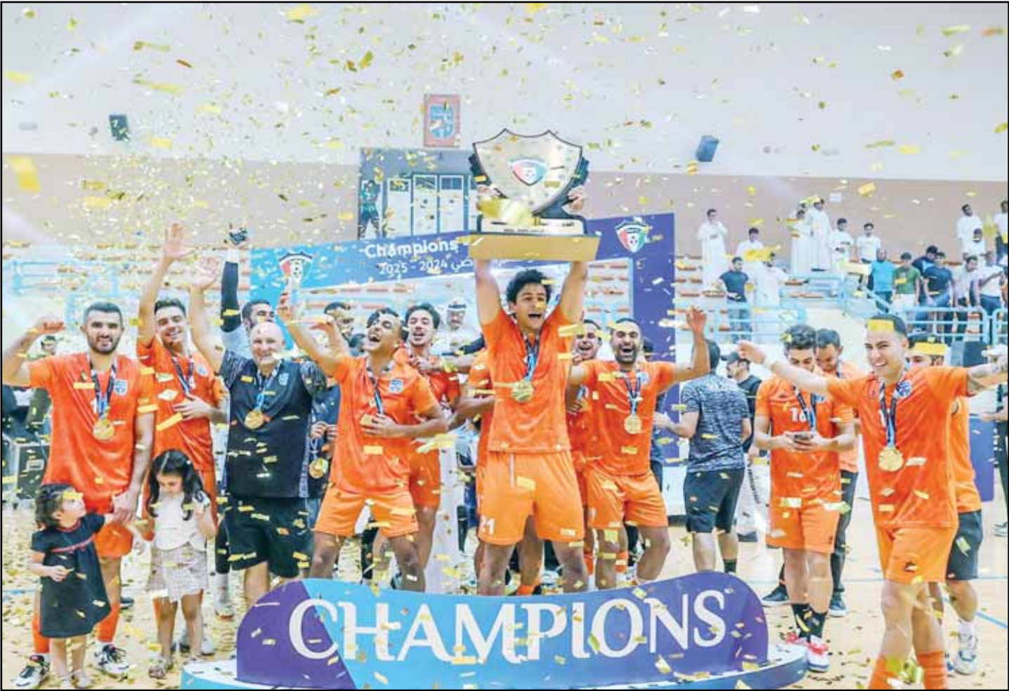
Kazma players celebrate with the league trophy.