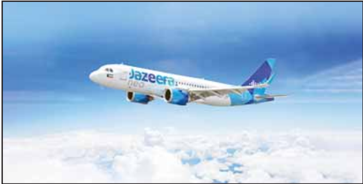
Jazeera Airways plane soars in the skies.

mascus will provide a critical bridge for thousands of Syrians living and working in Kuwait, while also supporting broader regional efforts to re-engage with Syria. In line with the wider momentum across the region, we are completely set up and ready to start flying as soon as we receive the required regulatory approvals.”