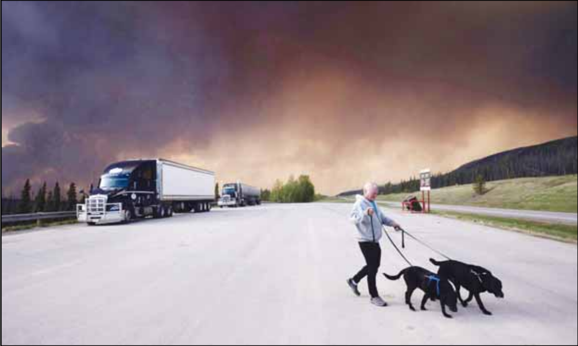
A tourist takes his dogs out for a quick break under billowing wildfire smoke off Highway 97 north of Buckinghorse River, British Columbia on May 30.

Air quality in some parts of the United States is worsening as smoke from dozens of wildfires in Canada travels south, pushed by winds high in the atmosphere. Through parts of Minnesota and into Wisconsin, the air quality is deemed unhealthy for people and animals sensitive to pollution and other airborne particles, according to the Environmental Protection Agency’s AirNow page. As of Friday afternoon, the interactive air quality map showed a strip of