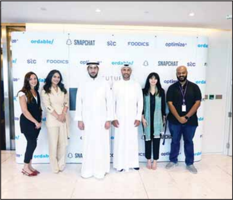
A group photo of the lecturers from Snapchat at various workshops.