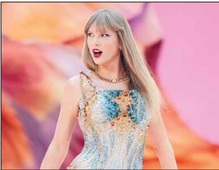
Taylor Swift performs at Wembley Stadium as part of her Eras Tour June 21, 2024, in London.

She did say, however, that she has completely rerecorded her self-titled debut album "and I really love how it sounds now."