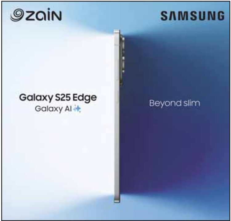
Galaxy S25 Edge Launch.

Available in Titanium Silver, Titanium Jet Black, and Titanium Icy Blue, the Galaxy S25 Edge is a testament to Samsung's commitment to innovation and design excellence, now fully unlocked by the power of Zain's award-winning network, ensuring an unmatched mobile experience across Kuwait.