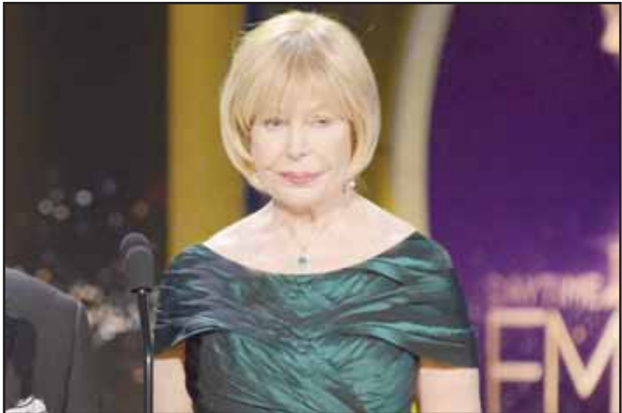
Loretta Swit presents a tribute to Mr. Rogersp at the 45th annual Daytime Emmy Awards on April 29, 2018, in Pasadena, Calif.