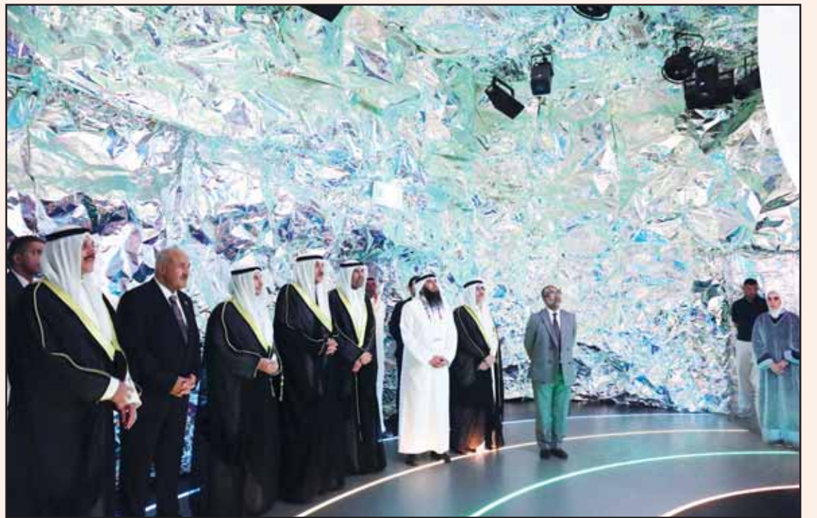
Crown Prince Diwan photos

HH the Crown Prince visits the Kuwait Pavilion at Expo 2025 Osaka, praising its display of national heritage and innovation. – See Page 5