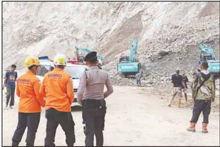
In this handout photo released by the Indonesian National Search and Rescue Agency (BASARNAS), rescuers search for victims at the site of a collapsed natural stones quarry in Cirebon district, West Java province, Indonesia on May 30. (AP)