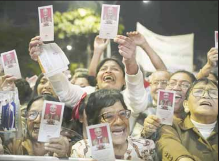
People celebrate waving flyers of newly-elected Pope Leo XIV during a mass in his honor in Chiclayo, Peru on May 10.