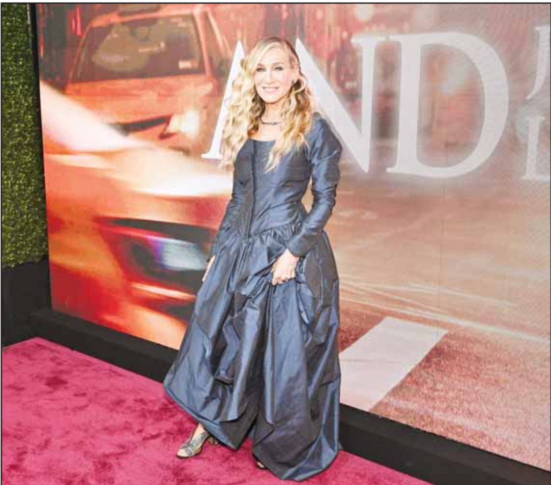
Sarah Jessica Parker attends the premiere of ‘And Just Like That...’ Season 3 at the Crane Club on Wednesday, May 21, in New York.

AUSTIN, Texas: A push in Texas to ban social media accounts for children under 18 has failed after lawmakers did not take a key vote on creating one of the nation’s toughest restrictions aimed at keeping minors off platforms such as TikTok, Snapchat and Instagram. The bill, which already passed the GOP-controlled state House, sought to go further than a Florida social media ban for minors under 14. Australia banned social media accounts for anyone under 16. The legislative session ends Monday and early momentum behind the Texas measure slowed at the eleventh hour in the state Senate as lawmakers face a weekend deadline to send bills to Republican Gov. Greg Abbott.