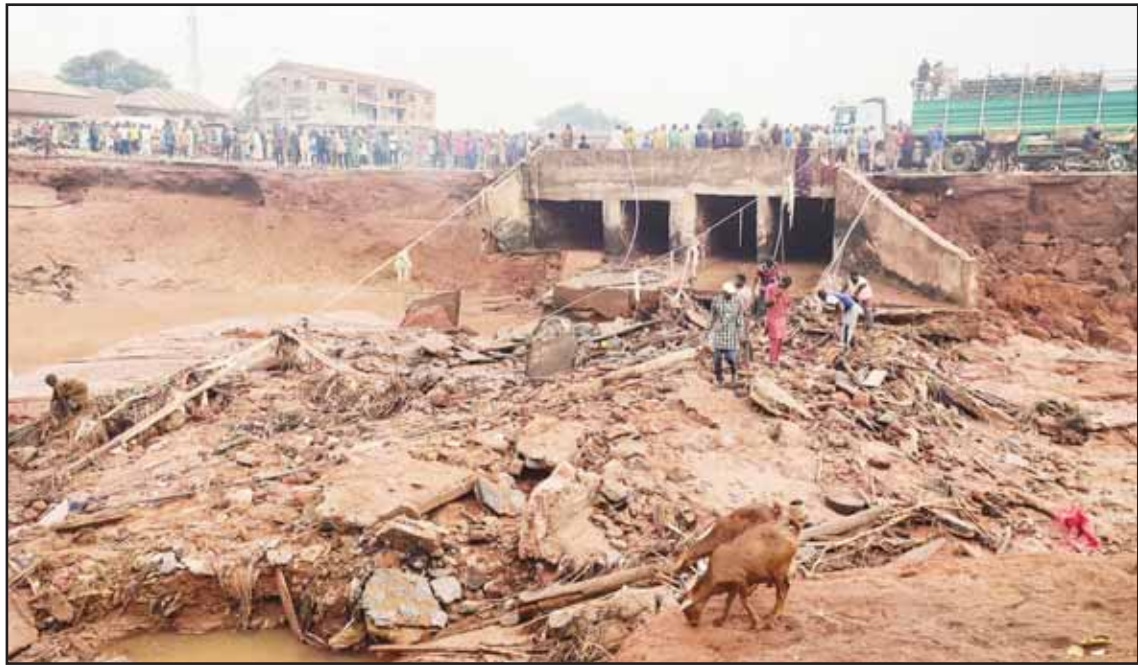
People search in flooded area following a downpour in Mokwa, Nigeria on May 30.