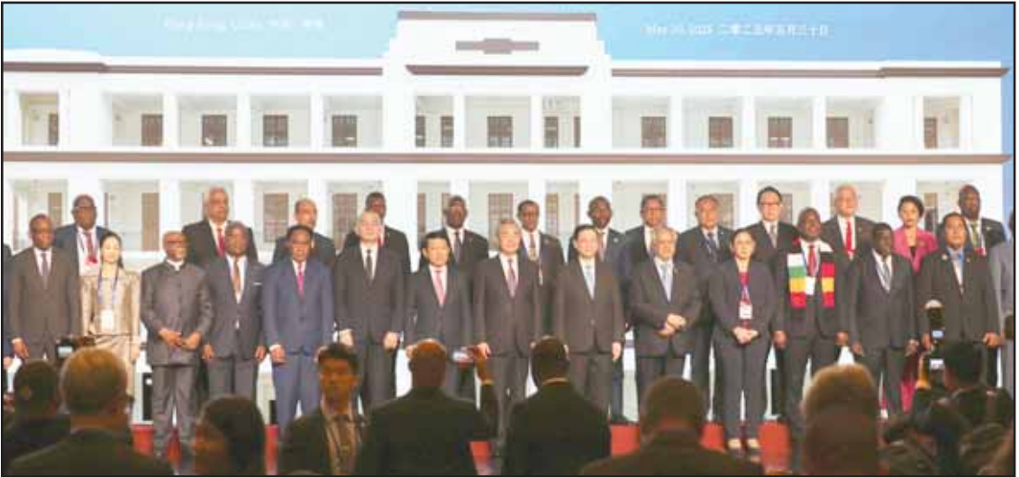
Chinese Foreign Minister Wang Yi, (center) attends the signing ceremony of "the Convention on the Establishment of the International Organization for Mediation", in Hong Kong on May 30. (AP)

HONG KONG, May 31, (AP): Dozens of countries joined China on Friday in establishing an international mediation-based dispute resolution group. Representatives of more than 30 other countries, from Pakistan and Indonesia to Belarus and Cuba, signed the Convention on the Establishment of the International Organization for Mediation in Hong Kong to become founding members of the global organization, following Chinese Foreign Minister Wang Yi. The support of developing countries signaled Beijing's rising influence in the global south amid heightened geopolitical tensions, partly exacerbated by US President Donald Trump's trade tariffs. At a ceremony, Wang said China has long advocated for handling differences with a spirit of mutual understanding and consensus-building through dialogue, while aiming to provide "Chinese wisdom" for resolving conflicts between nations. "The establishment of the International Organization for Mediation helps to move beyond the zero-sum mindset of 'you lose and I win,'" he said. The body, headquartered in Hong Kong, aims to help promote the amicable resolution of international disputes and build more harmonious global relations, he said. Beijing has touted the organization as the world's first intergovernmental legal organization for resolving disputes through mediation, saying it will be an