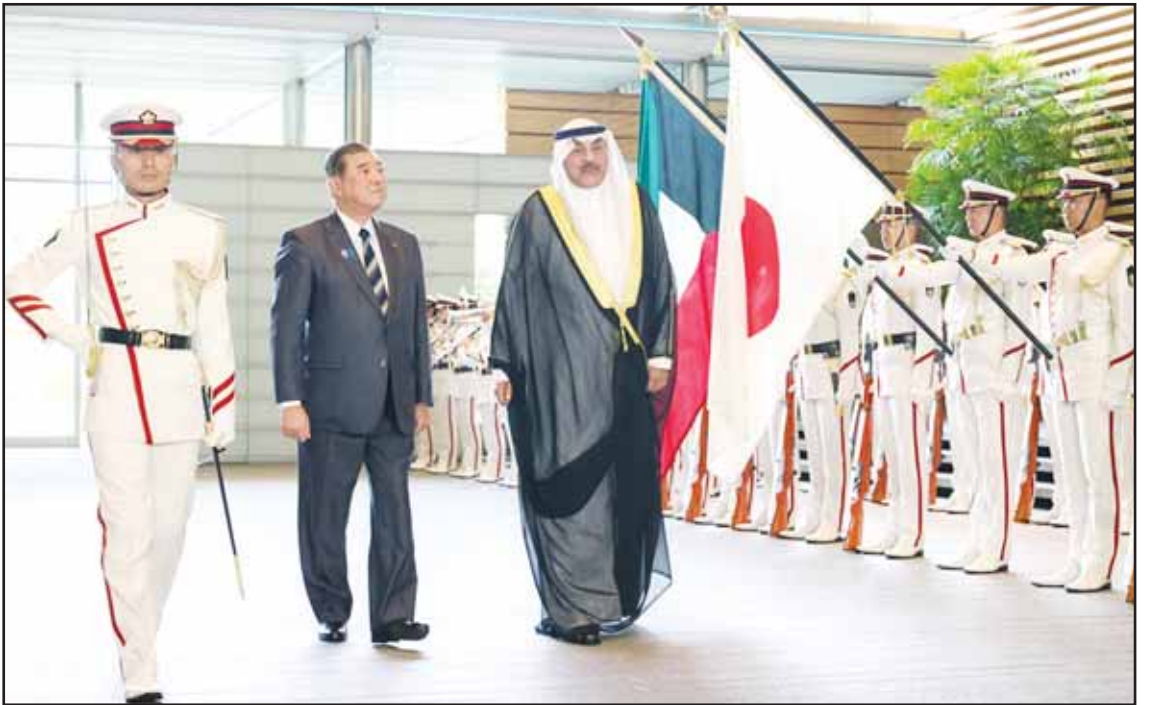
Japanese Prime Minister Shigeru Ishiba receives His Highness the Crown Prince Sheikh Sabah Khaled Al-Hamad Al-Sabah with an official ceremony in Tokyo, featuring a military parade and national anthems.

His Highness affirmed Kuwait's desire to enhance the bilateral ties between the two countries to reach the level of strategic partnership.