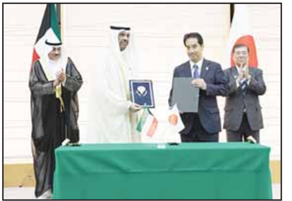
Crown Prince Diwan photos