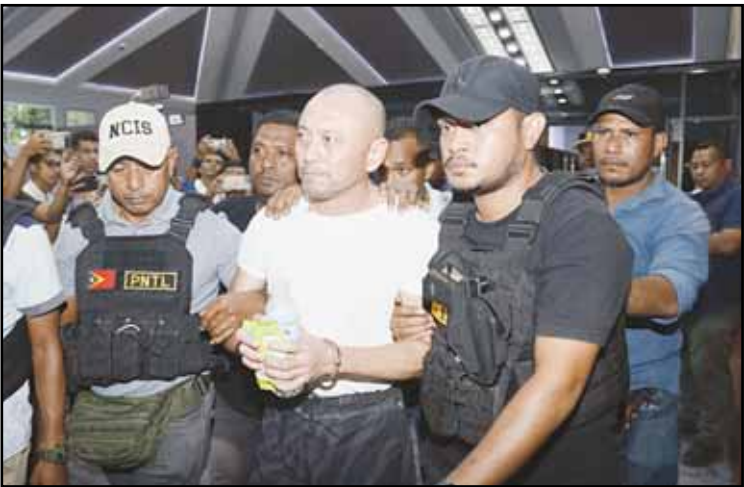
A former Filipino congressman charged with multiple murders in the Philippines, Arnolfo Teves Jr, center, is escorted by police officers in Dili, East Timor, on May 25.

of a campaign promise to bring down the price of rice and many reports of kidnappings and other crimes.