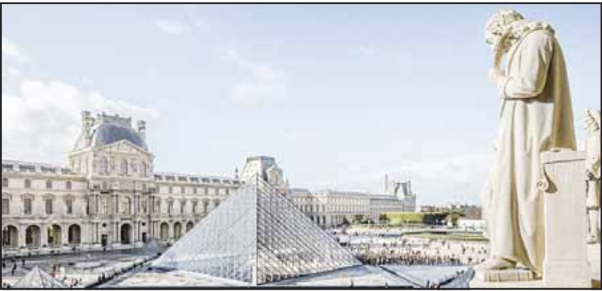
Another view of the Louvre Museum.