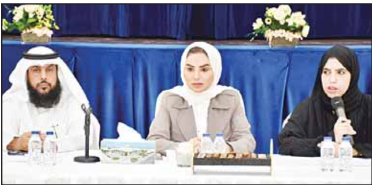
Minister of Social, Family and Childhood Affairs Dr. Amthal Al-Huwaila at the press conference.

KUWAIT CITY, May 29: Minister of Social, Family and Childhood Affairs Dr. Amthal Al-Huwaila has emphasized the importance of carrying out oversight work to the best possible extent, as well as the importance of the cooperative sector for food and economic security in the State of Kuwait. Speaking at the open meeting with the Control and Inspection Department at the Cooperative Sector in the Ministry of Social Affairs held Thursday at the Community Development Center in Zahraa, Al-Huwaila said "we are pointing our finger at the flaws. No work is free of human error, so we must assess how to address these errors, as responsibility is always shared." She added "this is our second meeting with you. You are the people in the field, and you know better than any other sectors far removed from the field. We will speak with complete transparency, because our goal is the same: to develop this work and enhance the overall reputation of the cooperative sector, which is one of the most important sectors in food and economic security. Cooperative societies play a major role in Kuwait." She explained that "the cooperative sector's experience is unique. The Gulf and Arab countries consider it a successful and fruitful model, because it provides community services and includes direct contributions from citizens. We are all partners in these cooperative societies."