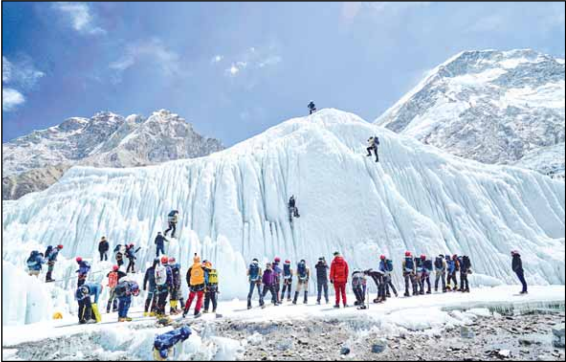
Indian Army personnel take part in a training session at Everest Base Camp before beginning their ascent to Mount Everest in Nepal, April 26, 2025.