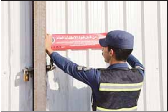
KFF personnel seal one of the warehouses violating safety rules.

He urged judges and advisors to adhere strictly to session schedules and avoid issuing conflicting rulings in similar cases.