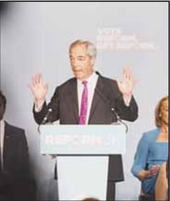
Nigel Farage, leader of the Reform UK party, speaks at an event in London on May 27.

Starmer branded Farage’s economic plans “Liz Truss 2.0,” evoking the Conservative former prime minister who