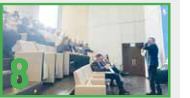
8 NBK hosts strategic thinking lecture by IE Business School professor

In a statement Thursday, the Ministry of Foreign Affairs affirmed Kuwait's firm position and its absolute rejection of all forms of violence and terrorist acts, emphasizing the importance of the international community joining forces to combat the roots of terrorism and enhance regional and international security and stability. (KUNA)