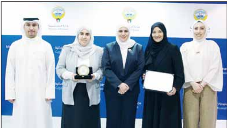
Kuwait's Minister of Finance Noura Al-Fassam in a group photo.

The statement added that Al-Fassam received the award on behalf of the ministry, which participated in the digital payment project for government services that enables government entities to purchase online, pay government fees, and meet various needs to fulfill their financial obligations.