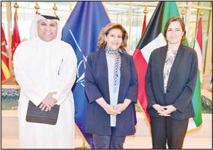
Kuwait's Assistant Foreign Minister for Human Rights Affairs Ambassador Sheikhah Jawaher Al-Sabah with officials.

The Kuwaiti Ambassador expressed pride in the significant gains achieved by Kuwaiti women, including the abolition of Articles 153 and 182 of Kuwaiti law and the continued support of the political leadership to empower women to reach decision-making positions.