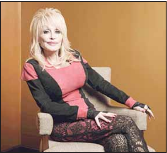
Dolly Parton poses at the Carnegie Medal of Philanthropy Ceremony in New York, on Oct. 13, 2022.

I’ve met, and all of the things that happen when you’re traveling like that as I have for all of these years. So, that, and then I have my life story as a musical. It’s called ‘Dolly: An Original Musical.’ And I’ve written a lot of original songs for it. Of course, it’ll have the big hits that are woven into the story. And it’s just about my life, from