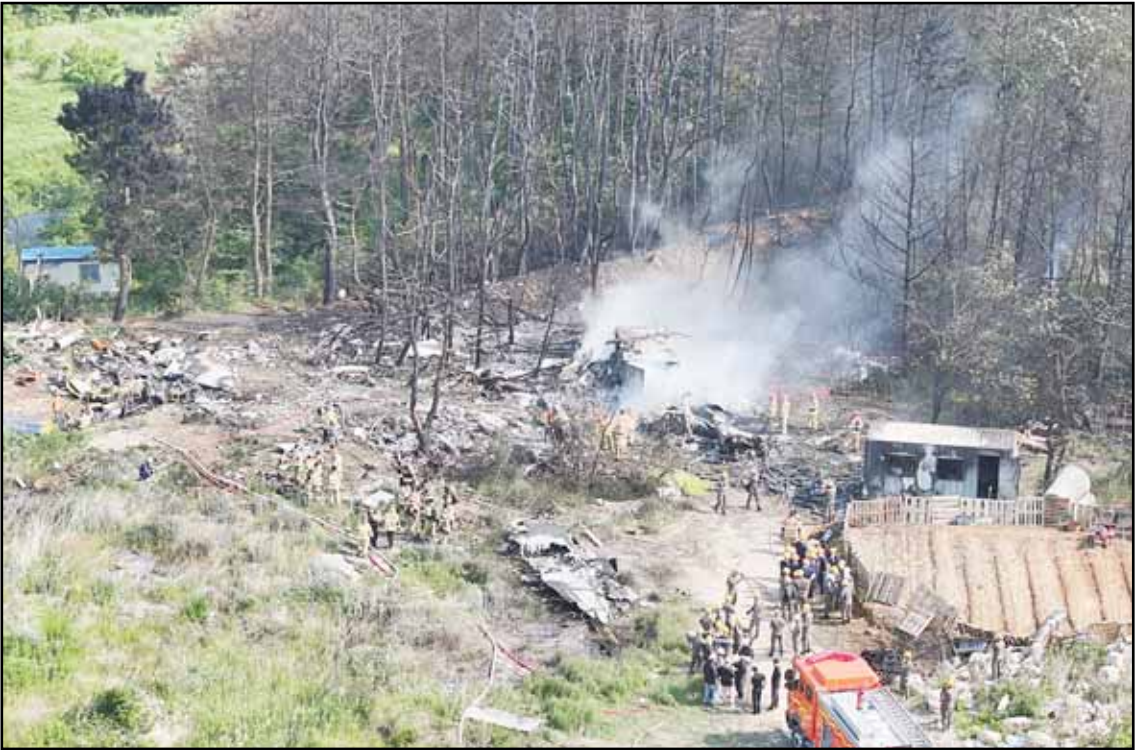
South Korean firefighters and military officers work at the scene of a South Korean navy plane’s crash in Pohang, South Korea on May 29. (AP)

A South Korean navy plane crashed during a training flight on Thursday, killing all four crew members on board, the navy said. The P-3 patrol plane took off from its base in the southeastern city of Pohang at 1:43 p.m. and crashed due to unknown reasons, the navy said in a statement. It said it had identified the bodies of the four crew members and was in the process of recovering them. There were no immediate reports of civilian casualties on the ground. The navy set up a task force to investigate the crash and temporarily grounded its P-3s. An emergency office in Pohang said that rescuers and fire trucks were dispatched to the site after receiving reports from residents that an aircraft crashed on a hill near an apartment complex and caused a fire. (AP)