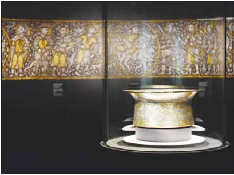
Some of the items displayed by the museum from the Mamluk exhibition.