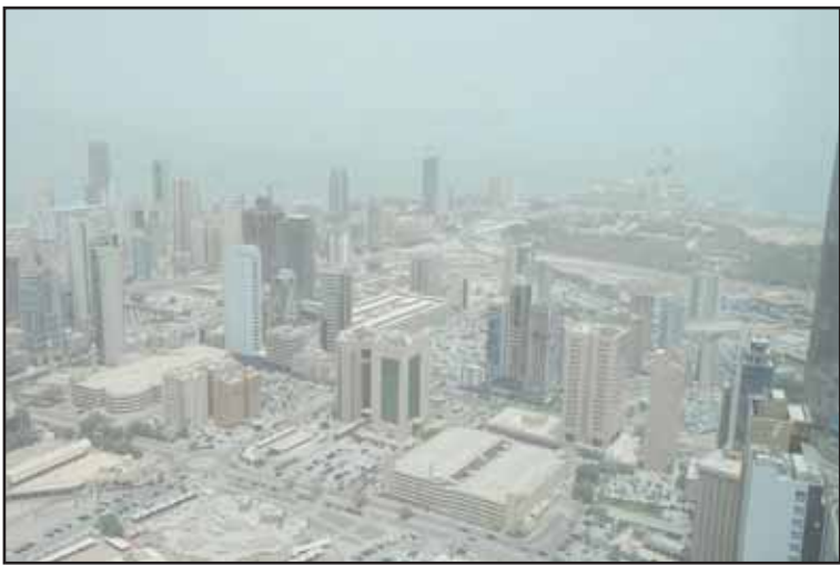
A thick dust haze engulfs Kuwait's skyline, cloaking buildings in a dense, eerie veil on Thursday.