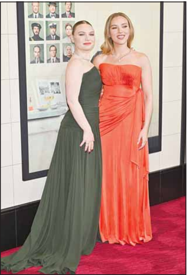
Mia Threapleton, (left), and Scarlett Johansson attend the premiere of ‘The Phoenician Scheme’ at Jazz at Lincoln Center on Wednesday, May 28, in New York.

His plans are contained in a series of shoeboxes. But Liesl isn’t very interested in the Korda Land and Sea Phoenician Infrastructure Scheme. What she wants to know is who killed her mother. She also mentions they haven’t seen each other in six years. (“I apologize,” he says.) And she wonders why none of his nine sons, young boys