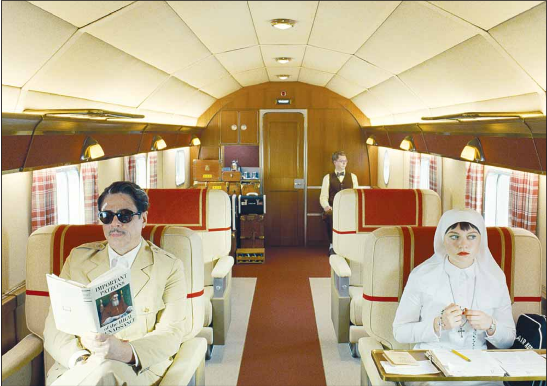
This image released by Focus Features shows, (from left), Benicio Del Toro, Michael Cera and Mia Threapleton in a scene from ‘The Phoenician Scheme.’

Threapleton shines in ‘Phoenician Scheme’