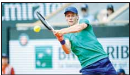
Italy's Jannik Sinner returns the ball to France's Richard Gasquet during their second round match of the French Tennis Open, at the Roland-Garros stadium, in Paris. Sinner won 6-3, 6-0, 6-4.