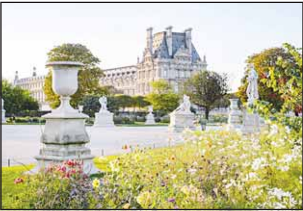
A view of the Louvre Museum.