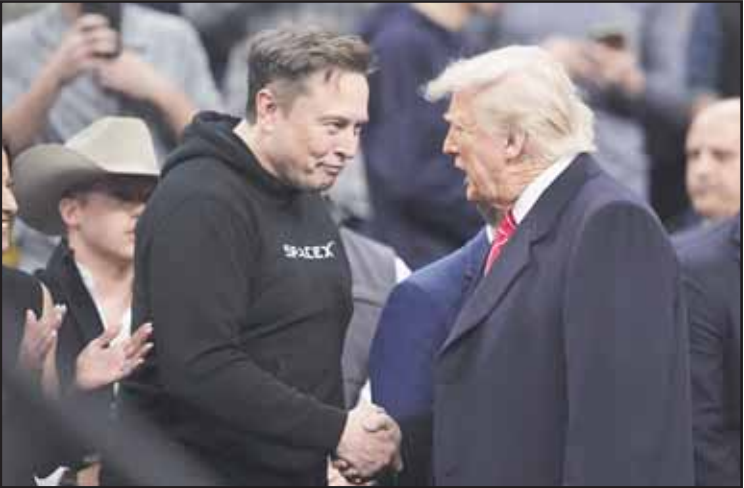
Elon Musk (left), shakes hands with President Donald Trump at the finals for the NCAA wrestling championship, March 22, in Philadelphia.

Trump, speaking in the Oval Office on Wednesday, defended his agenda by talking about the delicate politics