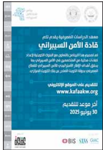
Flyer of the program.