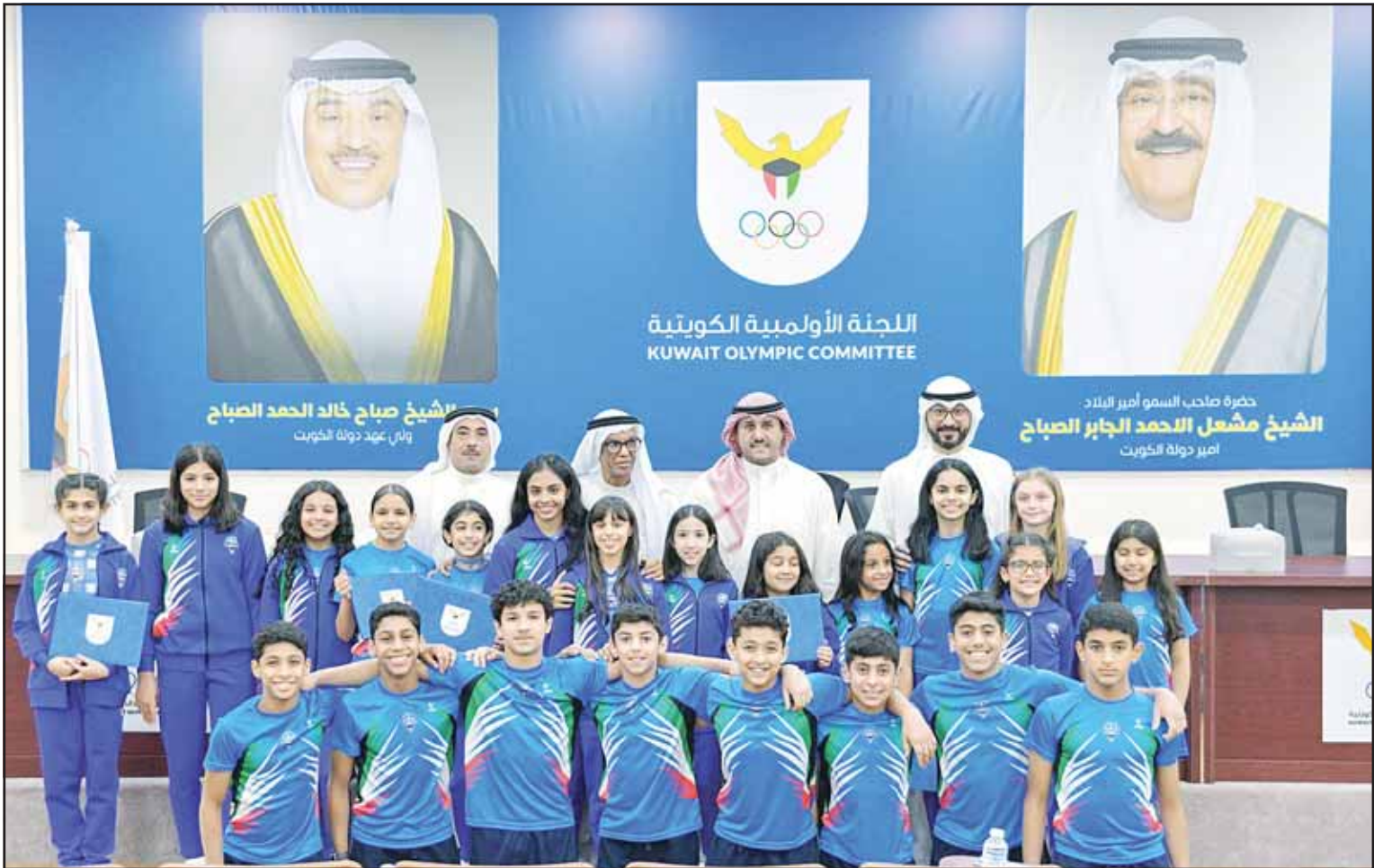
The gymnastics team poses with the Kuwait Olympic Committee officials.

KUWAIT CITY, May 29: The Kuwait Olympic Committee hosted a celebratory reception for the national artistic gymnastics team in recognition of their outstanding performance at the West Asian Championships for youth, juniors, and girls, recently held in Jordan. The Kuwaiti delegation brought home an impressive 32 medals, including 17 gold, 6 silver, and 9 bronze, setting a new milestone for the sport in the country.