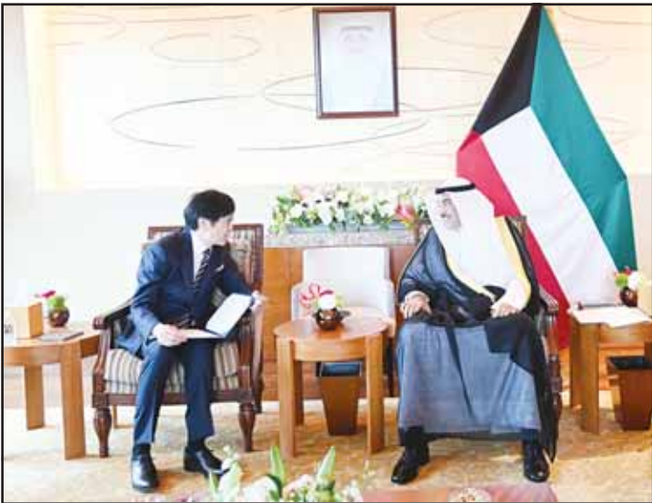
HH the Crown Prince receives Representative Director and COO of Hakuodo Japan.