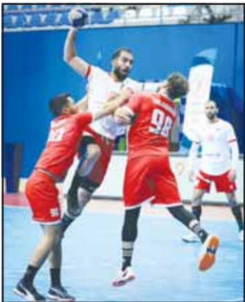
Kuwait Club is tackled as he goes for a shot.