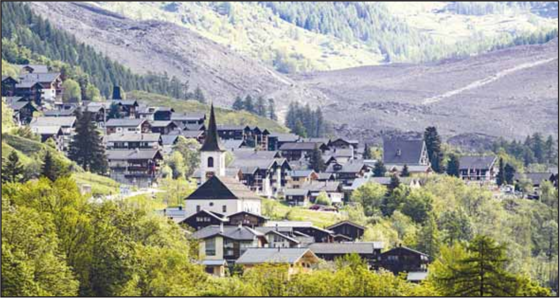
A massive debris avalanche, with the village of Kippel in the foreground, is seen on May 29, one day after the collapse of the Birch Glacier causing the demolishing of the village of Blatten in Switzerland.

His latest criticism could embolden Republicans who want bigger spending cuts. Republican Utah Sen. Mike Lee reposted a Fox News story about Musk’s interview while also adding his own take on the measure, saying there was “still time to fix it.”