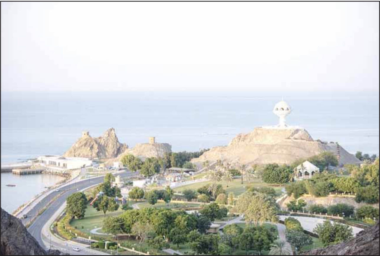
A view of eco-tourism in the Sultanate of Oman.