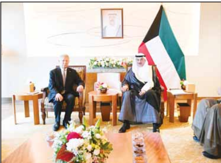
Left: HH the Crown Prince receives Member of the Japanese House of Representatives and President of the Japan-Kuwait Parliamentary Friendship Association. Center: HH the Crown Prince receives Tokyo Governor. Right: HH the Crown Prince receives Chairman of the Japan Cooperation Center for the Middle East and Mitsubishi Heavy Industries.