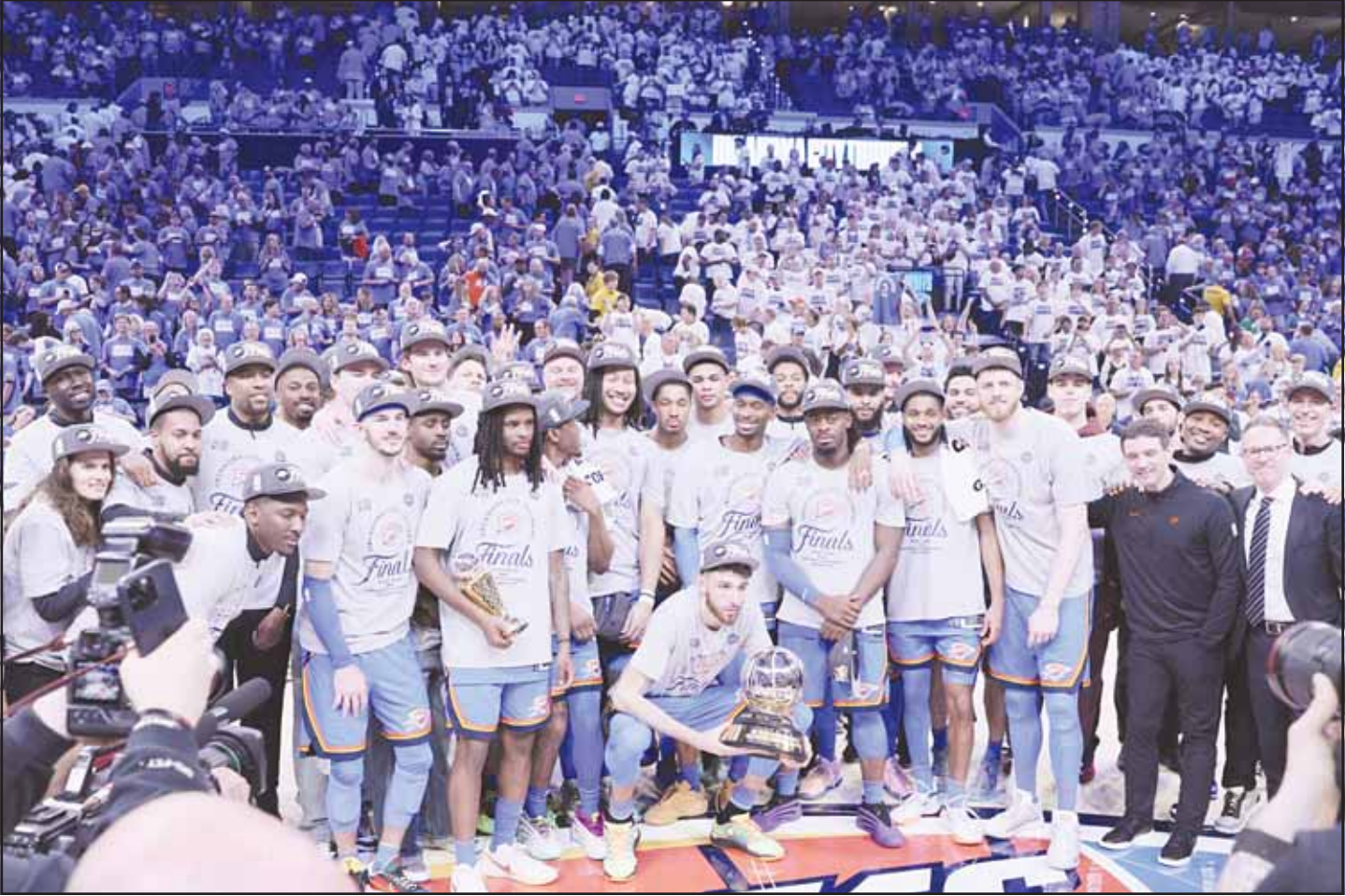
Oklahoma City Thunder players and coaches celebrate after Game 5 of the Western Conference finals of the NBA basketball playoffs against the Minnesota Timberwolves in Oklahoma City.