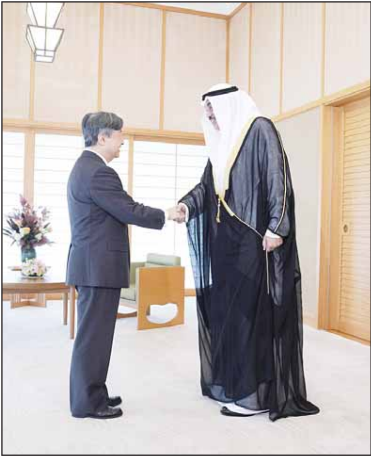
His Highness the Crown Prince Sheikh Sabah Khaled Al-Hamad Al-Sabah shakes hands with Japanese Emperor Naruhito.