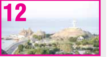
12 Eco-tourism in Oman: Shaped by natural wonders, location