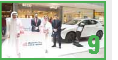
9 Gulf Bank launches 'Start Smart' campaign for Kuwaitis