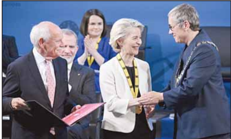
European Commission President Ursula von der Leyen, center, receives the Charlemagne Prize in Aachen, Germany on May 29.

Even if the European Commission’s makeup has hardly become the talk of bar rooms or barber shops across the vast EU of 450 million people, it has enthralled the upper echelons of politics and bureaucracy, as they sought to boost one candidate or undermine another.