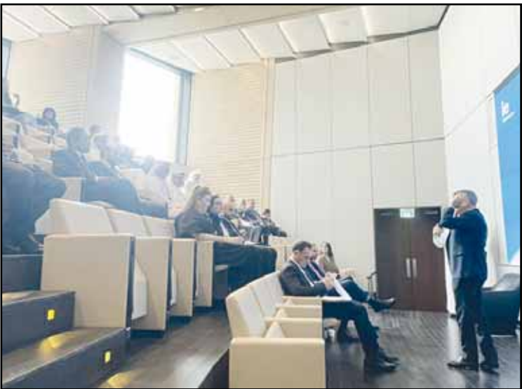
Part of the lecture.

“We believe that human capital investment is an integral part of NBK’s strategy that aims to achieve sustainable growth and guarantee its excellence and leadership, which is why we strive to provide the best and most innovative training opportunities that factor in the changing market dynamics in order to ensure building a resilient workforce capable of fac-