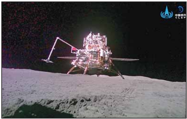
This China National Space Administration (CNSA) handout image released by Xinhua News Agency, shows the lander-ascender combination of Chang'e-6 probe taken by a mini rover after it landed on the moon surface, June 4, 2024. (AP)

TAIPEI, Taiwan, May 29, (AP): China launched a spacecraft that promises to return samples from an asteroid near Mars and yield "groundbreaking discoveries and expand humanity's knowledge of the cosmos," the country's space agency said.