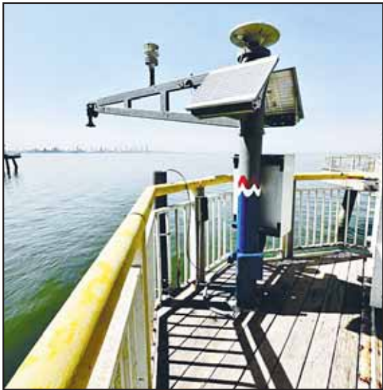
The sea level measurement station launched by KISR.

Bid to tackle growing impact of climate change