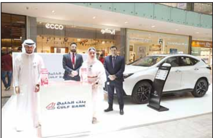
Sales team at Gulf Bank booth in Al Kout Mall.

KUWAIT CITY, May 29: Gulf Bank has rolled out an exclusive offer for Kuwaiti citizens under the slogan “Start Smart.” As part of this campaign, customers who transfer their salaries to Gulf Bank can receive a cash gift of up to KD 1,200, along with a variety of benefits aimed at unlocking new opportunities and supporting them in achieving their goals, step by step. Gulf Bank salary account holders will enjoy a comprehensive suite of benefits, including automatic enrollment in Kuwait's fastest rewards program, which allows them to redeem points for cash, book flights, hotels, and car rentals, as well as shop through one of the region's pioneering bank-exclusive e-commerce platforms. The offer also features exclusive discounts at leading car dealerships, including 0% interest on select vehicles. Eligible customers can apply for a personal loan of up to KD 25,000 repayable over five years, as well as a housing loan of up to KD 70,000 with a repayment period of up to 15 years. Additionally, the offer features a one-year safe deposit box rental and a lifetime credit card. This offer is available to Kuwaiti employees in the government, semi-government, and oil sectors, as well as newly hired Kuwaitis or those transferring their salaries to