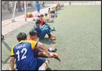
Photos of the Football Camp