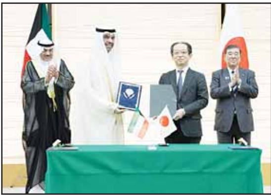
Exchange of signed agreements between Kuwait and Japan, witnessed by His Highness the Crown Prince Sheikh Sabah Khaled Al-Hamad Al-Sabah and Japanese Prime Minister Shigeru Ishiba in Tokyo.