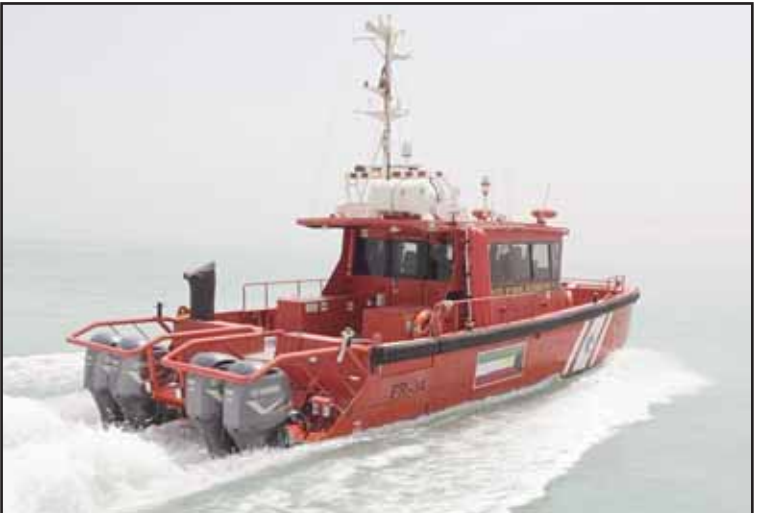
KFF boat to the rescue.

in the Interior Ministry, along with the confiscated drugs. Meanwhile, the General Directorate of Coast Guards thwarted a large number of attempts to smuggle drugs into Kuwait, including the seizure of approximately 125 kilograms of hashish worth half a million dinars, and the arrest of three Iranian smugglers in March, reports Al-Seyassah daily. The General Directorate of Coast Guards affirmed that its personnel serve as a strong security shield against any attempts to breach territorial waters or smuggle contraband into the country.