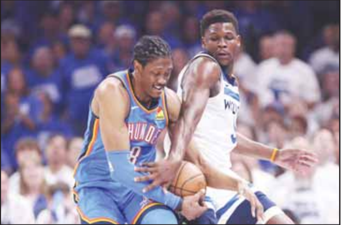
Oklahoma City Thunder forward Jalen Williams (8), left, and Minnesota Timberwolves guard Anthony Edwards (5) battle for possession of the ball during the first half of Game 5 of the Western Conference finals of the NBA basketball playoffs in Oklahoma City.

took care of business from the jump. We were focused. We were together. We were energetic, we were aggressive, and the game turned out the way it did.” Gilgeous-Alexander’s big night went beyond measurables. Coach Mark Daigneault said his leadership helped the Thunder get off to the strong start. “He just set an unbelievable tone,” Daigneault said. “I think he understood his role in our mentality. He was a participant in that and he was a leader in that. And he was ready to play from the jump.” For the series, Gilgeous-Alexander averaged 31.4 points, 8.2 assists and 5.2 rebounds per game and received the Magic Johnson Trophy for MVP of the Western Conference Finals. None of that will matter when the Thunder play either the Indiana Pacers or the New York Knicks in the Finals, starting June 5. The Pacers lead the Eastern Conference finals series 3-1 with Game 5 in New York City on Thursday night. “We have to be the best version of ourselves for four nights to reach the ultimate goal,” Gilgeous-Alexander said. “We understand that, we know that, and that’s what we’re focused on.