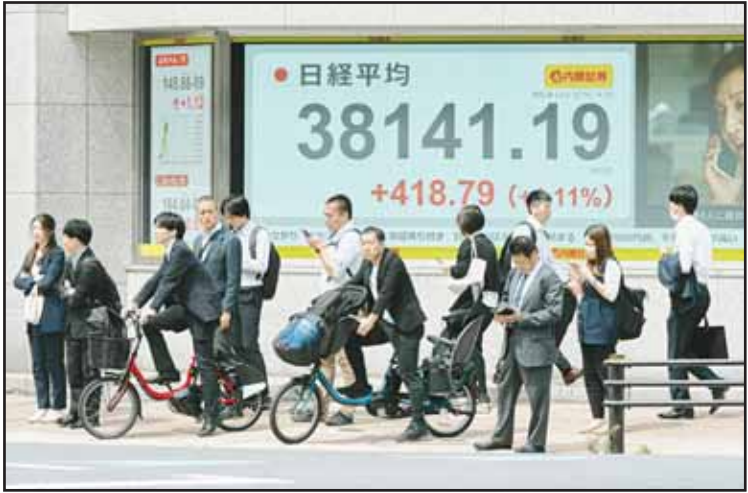
People stand in front of an electronic stock board showing Japan's Nikkei index at a securities firm in Tokyo.

turmoil caused by Trump's trade war may have passed. It had been roughly 20% below the mark last month. The Dow industrials lost 0.6% and the Nasdaq composite fell 0.5%. Trading was relatively quiet ahead of a quarterly earnings release for Nvidia, which came after markets closed. The bellwether for artificial intelligence overcame a wave of tariff-driven turbulence to deliver another quarter of robust growth thanks to feverish demand for its high-powered chips that are making computers seem more human. Nvidia's shares jumped 6.6% in afterhours trading. Like Nvidia, Macy's stock also swung up and down through much of the day, even though it reported milder drops in revenue and profit for the latest quarter than analysts expected. Its stock ended the day down 0.3%. The bond market showed relatively little reaction after the Federal Reserve released the minutes from its latest meeting earlier this month, when it left its benchmark lending rate alone for the third straight time. The central bank has been holding off on cuts to interest rates, which would give the economy a boost, amid worries about inflation staying higher than hoped because of Trump's sweeping tariffs. In other dealings early Thursday, the yield on the 10-year Treasury rose to 4.52% from 4.47% late Wednesday. U.S. benchmark crude oil gained $1.06 to $62.90 per barrel. Brent crude, the international standard, added $1.01 to $65.33 per barrel. The euro slipped to $1.1242 from $1.1292.