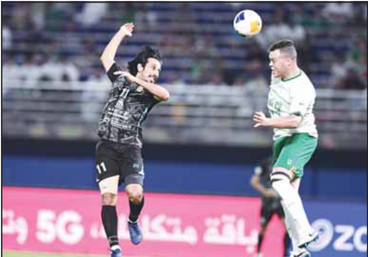
A file photo of players in an aerial battle for the ball.

With both teams hungry for success and redemption, fans can expect a fiercely contested battle as the Amir Cup nears its dramatic conclusion.