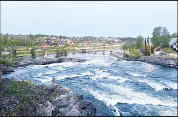
The town of Kongsberg, which is the headquarters of a defense company which makes missiles for Ukraine and is seen as a potential target for sabotage, is seen in Norway on May 7.

As Moscow wages war in Ukraine, Western officials are accusing Russia of being behind a campaign of sabotage, arson and cyberattacks and there are jitters across the continent about