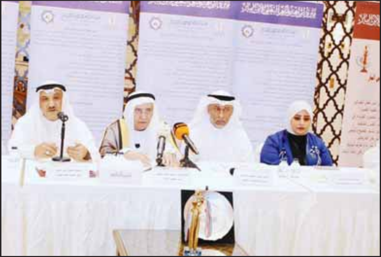
The press conference in progress.

They emphasized that political and institutional commitment in their countries has led to a significant increase in women’s participation in security and diplomatic sectors and decision-making positions, reflecting the positive impact of the resolution’s implementation.