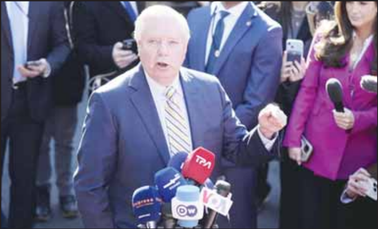
US Sen Lindsey Graham, R-S.C., speaks to reporters outside the West Wing of the White House on Feb 28, in Washington.

SANTA FE, NM: Competition for the Democratic nomination for governor in New Mexico is heating up as for-