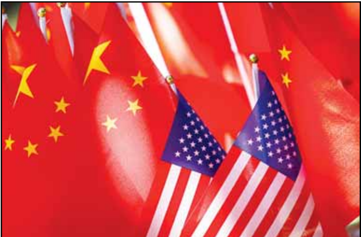
American flags are displayed together with Chinese flags on top of a trishaw on Sept 16, 2018, in Beijing.

BEIJING, May 29, (Xinhua): The discriminatory practice by the United States to revoke the visas for Chinese students exposes its lies of so-called “freedom and openness,” Chinese foreign ministry spokesperson Mao Ning said here on Thursday. Mao made the remarks at a daily press briefing when answering a related query. The US side unreasonably revoking the visas for Chinese students, under the pretext of ideology and national security, severely infringes upon the legitimate rights and interests of Chinese students and disrupts normal people-to-people exchanges between the two countries, Mao said. “China firmly opposes this and has lodged representations with the US side,” Mao said. This politically motivated and discriminatory practice by the United States exposes its lies of self-proclaimed freedom and openness, and will only further damage the country’s international image and credibility, Mao noted.