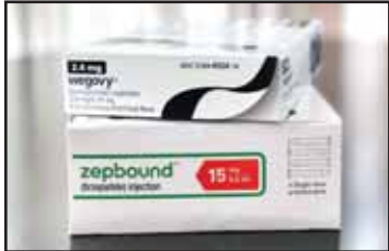
Boxes for the medications Wegovy and Zepbound are arranged for a photograph in California on May 8, 2025. (AP)

NEW YORK, May 24, (AP): Excess body weight can raise the risk of certain cancers, leading researchers to wonder whether blockbuster drugs like Wegovy, Ozempic and Zepbound could play a role in cancer prevention. Now, a study of 170,000 patient records suggests there's a slightly lower risk of obesity-related cancers in US adults with diabetes who took these popular medications compared to those who took another class of diabetes drug not associated with weight loss. This type of study can't prove cause and effect, but the findings hint at a connection worth exploring. More than a dozen cancers are associated with obesity. "This is a call to scientists and clinical investigators to do more work in this area to really prove or disprove this," said Dr. Ernest Hawk of MD Anderson Cancer Center in Houston, who was not involved in the study. The findings were released Thursday by the American Society of Clinical Oncology and will be discussed at its annual meeting in Chicago. The study, funded by the National Institutes of Health, was led by Lucas Mavromatis, a medical student at New York University's Grossman School of Medicine. "Chronic disease and chronic disease prevention are some of my passions," said Mavromatis, a former research fellow with an NIH training program. GLP-1 receptor agonists are injections used to treat diabetes, and some are also approved to treat obesity. They work by mimicking hormones