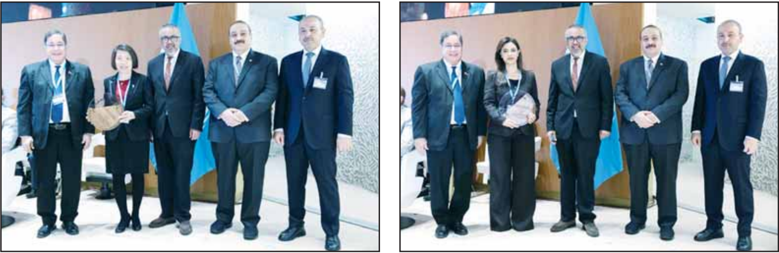
Photos from the awarding ceremony.