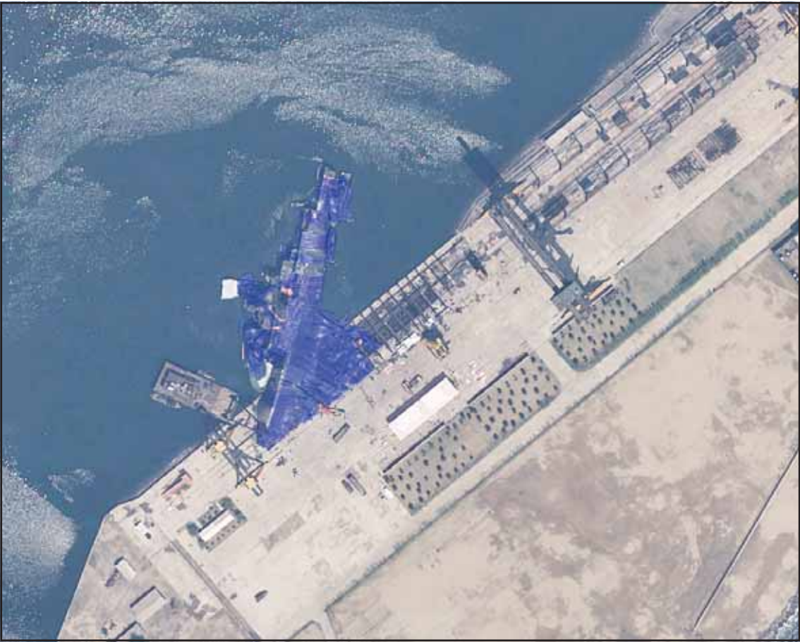
This satellite image provided by Airbus DS, shows a blue tarp covering a North Korean destroyer after it suffered a failed launch while it was being put to sea in Chongjin, North Korea on May 22.