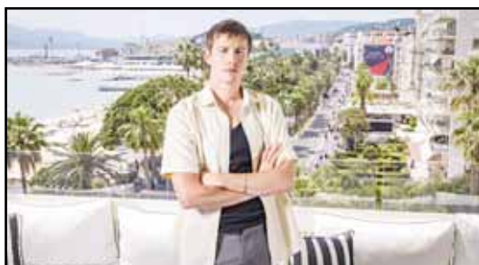
Director Harris Dickinson poses for a portrait photograph for the film 'Urchin' at the 78th international film festival, Cannes May 18.

ing two Oscar nominations in 2020, for "Marriage Story" and "Jojo Rabbit."