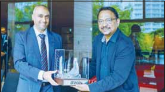
Exchange of commemorative gifts.