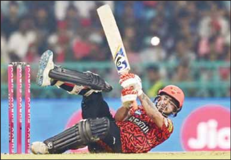
Sunrisers Hyderabad’s Ishan Kishan loses his balance while playing a shot during the Indian Premier League cricket match between Royal Challengers Bengaluru and Sunrisers Hyderabad at Atal Bihari Vajpayee Ekana Cricket Stadium in Lucknow, India.

towards a second century of the season but ran out of balls to hit. Cameos from Heinrich Klaasen (24 off 13) and Aniket Verma (26 off nine) - the duo hit five sixes - also steered Hyderabad past 200, including a whirlwind 43 off the last three overs. Bengaluru started well. Phil Salt survived a no ball to score 63 off 32 balls and put on 80 off 43 balls with Virat Kohli. Kohli scored 43 off 25 with seven fours and a six. Salt reached 50 off 27 and overall hit five sixes and four fours. The openers put Bengaluru’s chase on track, but fortunes changed with Kohli’s dismissal in the seventh over. Mayank Agarwal, in for the injured Devdutt Padikkal, was out for 11 and Rajat Patidar for 18. Stand-in skipper Jitesh Sharma made 24 off 15, sharing 44 off 26 with Patidar, but the lower order couldn’t hold the momentum. Bengaluru lost seven wickets for 16 runs across 25 balls.