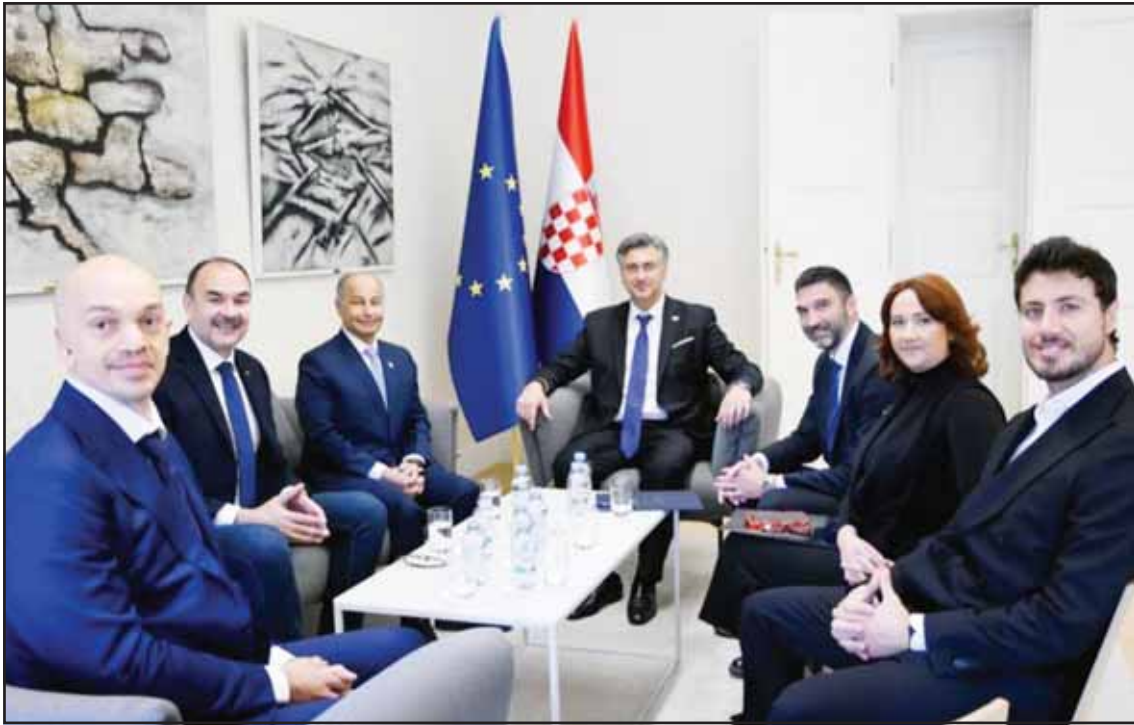
The meeting in progress.