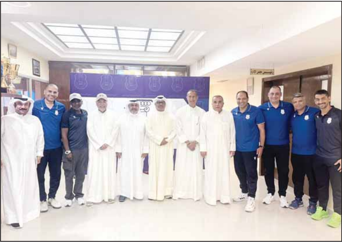
Yarmouk Board Members with the coaching staff.