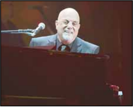
Musician Billy Joel performs during his 100th lifetime performance at Madison Square Garden on Wednesday, July 18, 2018, in New York.