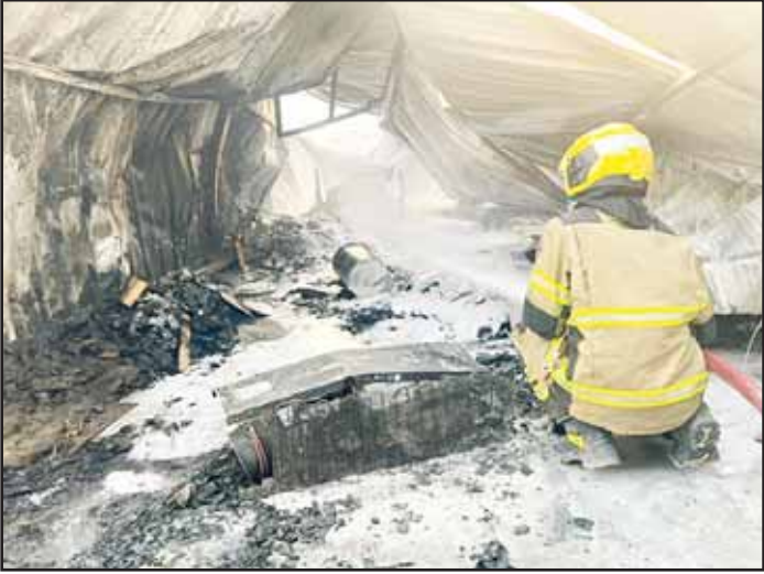
A fire-fighter tackles the blaze at the farmhouse and the damage caused (right).