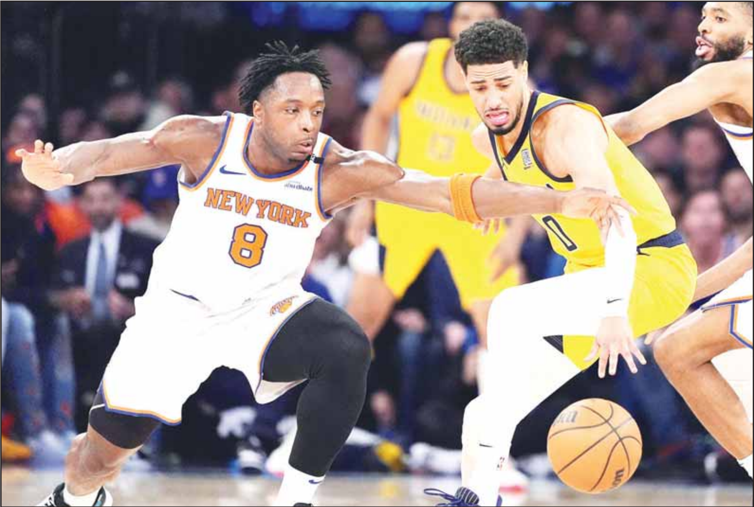
New York Knicks forward OG Anunoby (8) and Indiana Pacers guard Tyrese Haliburton (0) battle for a loose ball during the third quarter of Game 2 of the NBA basketball Eastern Conference final in New York.