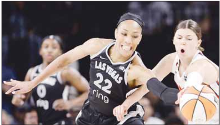
Las Vegas Aces center A’ja Wilson (22) and Washington Mystics guard Jade Melbourne, front right, fight for the ball during the first half of a WNBA basketball game in Las Vegas.

In Minneapolis, Napheesa Collier had 33 points and 11 rebounds, and the Minnesota Lynx used a late run to rally and beat the Connecticut Sun. The Lynx held the Sun scoreless for more than 4 1/2 minutes after Tina Charles hit a jumper to give Connecticut a 68-53 lead with 5:20 left. Collier hit a short jumper, the Lynx forced a shot-clock violation on the other end and then Collier made two free throws to tie it 68-all with 1:38 to play. Marina Mabrey missed a 3-point shot for the Sun before Natisha Hiedeman hit a straight-away 3 to cap an 18-0 run and give Minnesota its first lead of the game. Hiedeman scored eight of her 11 points as the Lynx (4-0) closed on a 23-2 run over the final five minutes. Jessica Shepard added 13 points. Mabrey hit four 3-pointers and finished with 22 points, eight rebounds and six assists for Connecticut (0-3). Haley Peters scored 12 points, Saniya Rivers added 11 and Olivia Nelson-Ododa finished with 10 points and 10 rebounds. Bridget Carleton hit a 3 about two minutes into the second quarter that trimmed the Lynx’s deficit to three points but Connecticut scored 14 of the next 19 before going into halftime leading 45-35. Minnesota limited Connecticut to 10-for-39 shooting and forced 13 Sun turnovers in the second half. Lindsay Allen (leg) left the game in the opening minutes and did not return for Connecticut.