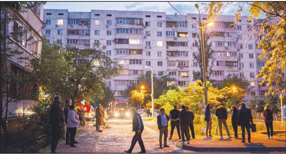
Local residents walk on a street with pieces of broken glass at the site of a residential building that was damaged after a Russian attack in Kyiv, Ukraine on May 24.

Caine, without Hegseth’s approval and an escort from his aides. The staff of the Joint Chiefs has traditionally maintained a good relationship with the press. Hegseth, the former Fox News Channel personality, issued his order via a posting on X late on a Friday afternoon before a holiday weekend. He said it was necessary for national security. “While the department remains committed to transparency, the department is equally obligated to protect (classified intelligence information) and sensitive information, the unauthorized disclosure of which could put the lives of U.S. service members in danger,” wrote Hegseth. The Pentagon Press Association expressed skepticism that operational concerns were at play - and linked the move to previous actions by Hegseth’s office that impede journalists and their coverage. “There is no way to sugarcoat it. Today’s memo by Secretary Hegseth appears to be a direct attack on the freedom of the press and America’s right to know what its military is doing,” it said in a statement Friday night.