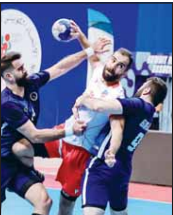
Players challenging for the ball.

KUWAIT CITY, May 24: Kuwait Club is eyeing a critical victory today in its quest to secure the Premier Handball League title as it faces Burgan at 6:00 pm in the fifth and final round of the Second Division of the league at Sheikh Saad Al-Abdullah Sports Complex and follows an earlier clash between Al-Arabi and Sulaibikhat at 4:30 pm, with Kazma and Salmiya squaring off at 7:00 pm. Currently, Kuwait Club leads the standings with 44 points, followed by Burgan with 37 points. Kazma holds third place with 28, while Salmiya (23), Sulaibikhat (20), and Al-Arabi (18) trail behind. With only Kuwait Club and Burgan left in the title race, today's showdown is pivotal. Kuwait Club, who have dominated the league for the past 12 consecutive seasons, are just two wins away from clinching another championship. A victory today would leave it needing only one win in the upcoming third-division stage, which begins next Wednesday - a task well within reach considering the team's strong form and depth. On the other side, Burgan is aiming to halt Kuwait Club's