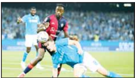
Napoli's Scott McTominay and Cagliari's Antoine Makoumbou vie for the ball during the Italian Serie A soccer match between Napoli and Cagliari at the Diego Maradona stadium in Naples, Italy.