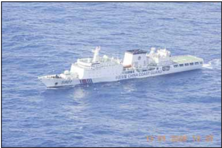
This image provided by Philippine Coast Guard shows a Chinese Coast Guard ship 5901 in the seas on Jan 13.