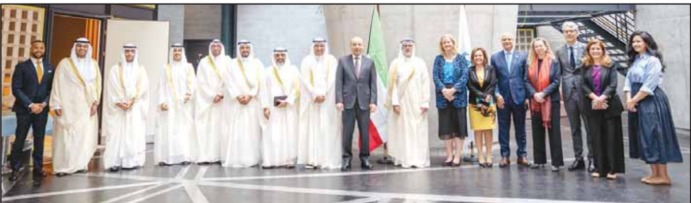
Kuwait delegation and the UN Refugee Agency officials pose for a picture after the first round of their strategic dialogue in Geneva.

GENEVA, May 24, (KUNA): Filippo Grandi, the United Nations High Commissioner for Refugees, has praised the State of Kuwait's leading support for refugees throughout the world, affirming that this backing would turn much more crucial in the shadow of current difficult challenges facing the nations. Grandi affirmed necessity of enhancing the long-term partnership between the two sides during the meeting that engaged a high-level Kuwaiti delegation headed by the Deputy Foreign Minister Ambassador Sheikh Jarrah Jaber Al-Ahmad Al-Sabab -- held in Geneva on Wednesday. The two sides underscored that the meeting signaled depth of the humanitarian partnership dating back to decades ago and the State of Kuwait's keenness on backing international aid for the refugees and the needy throughout the globe. They discussed during the meeting means of strengthening the coordination, overhauling mechanisms of humanitarian aid, explored major challenges facing humanitarian activities on the international stage and prospected cooperation