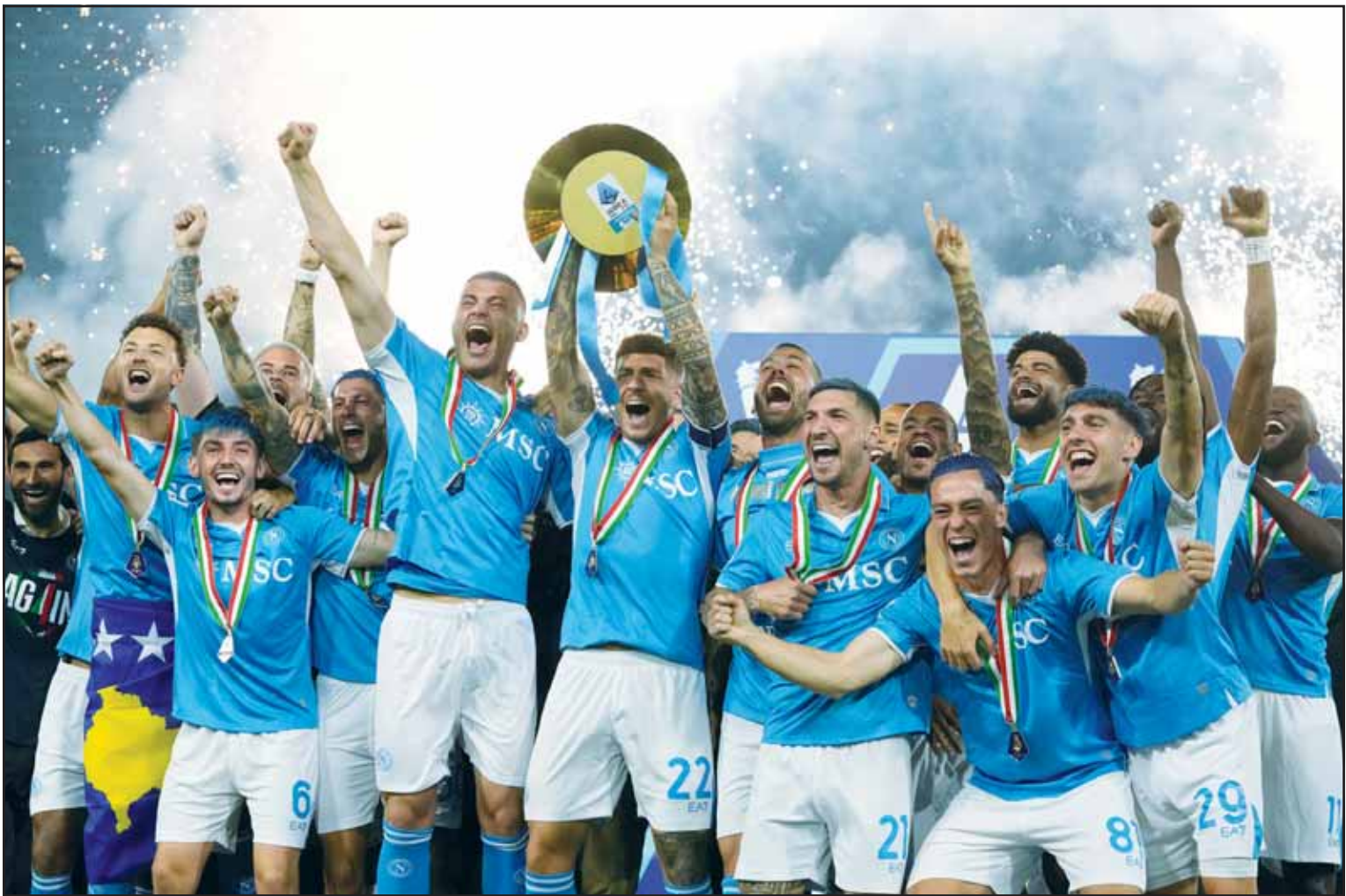
Napoli's players hold the trophy after winning the Italian league soccer title at the end of the Serie A soccer match between Napoli and Cagliari at the Diego Maradona stadium in Naples, Italy.

Scott McTominay scored with an acrobatic bicycle kick before halftime and Romelu Lukaku doubled the lead with a solo goal after the break in the decisive 2-0 home win over Cagliari. Conte became the first coach to win the Italian championship with three different teams. "Everyone contributed to this - but the coach most of all," Napoli captain Giovanni Di Lorenzo said. "Napoli needed him to get back on top. He's phenomenal." Comparing it to his three Serie A titles won at Juventus and one at Inter Milan - not to mention a Premier League title at Chelsea - Conte said it was "the most unexpected, the most difficult, and the most stimulating in terms of the challenge." Conte also noted how he had to try and convince players to stay when he arrived last June. Napoli needed only to do the same or better than defending champion Inter in the final round of matches, so Inter's 2-0 win at 10-man Como wasn't enough for the Nerazzurri. Napoli finished Serie A one point ahead of Inter.