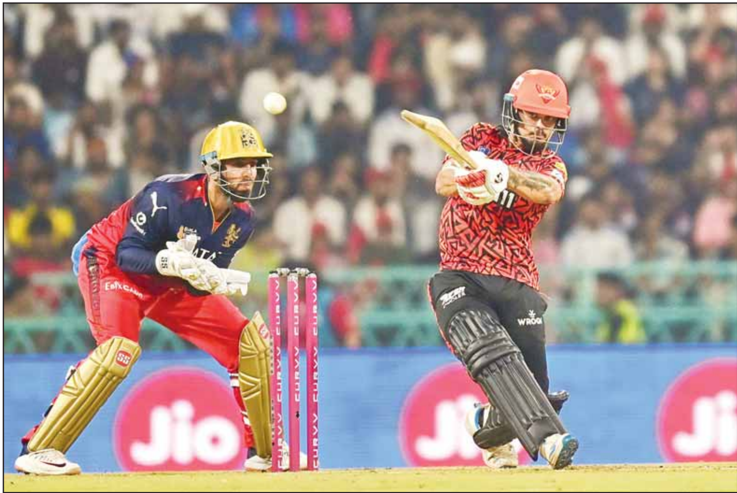
Sunrisers Hyderabad’s Ishan Kishan plays a shot during the Indian Premier League cricket match between Royal Challengers Bengaluru and Sunrisers Hyderabad at Atal Bihari Vajpayee Ekana Cricket Stadium in Lucknow, India.

LUCKNOW, India, May 24, Ishan Kishan’s unbeaten 94 off 48 balls helped Sunrisers Hyderabad beat Royal Challengers Bengaluru in its penultimate game of the Indian Premier League. Kishan hit five sixes and seven fours as Hyderabad notched up a huge 231-6. In reply, Bengaluru was bowled out for 189 in 19.5 overs, a defeat that dents its chances of finishing in the top two of the table. Bengaluru has already qualified for the knockouts and sits third. While it still has a game in hand, Bengaluru is dependent on Punjab Kings’ final two results for a top-two finish, which holds advantage in the knockouts. Hyderabad has already been eliminated from contention but managed to register its fifth win in 13 games. Opting to bowl, Bengaluru was hit by a quick start from the Hyderabad openers. Abhishek Sharma scored