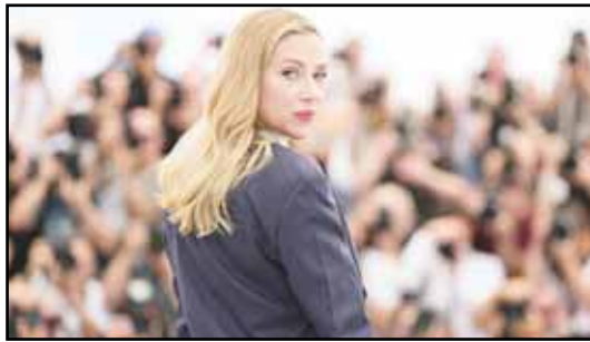
Director Scarlett Johansson poses for photographers at the photo call for the film 'Eleanor the Great' at the 78th international film festival, Cannes, southern France, May 21.

Johansson is now one of the world's most recognizable stars. She's also one of its most respected, earn-