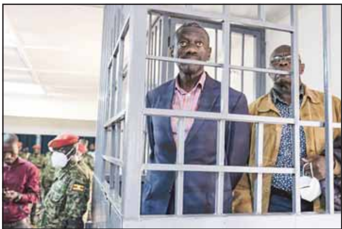
Ugandan opposition leader and four-time presidential candidate Kizza Besigye, stands in the dock at the Makindye Martial Court in Kampala, Uganda on Nov 20, 2024.