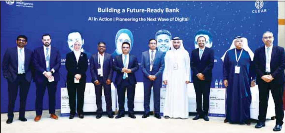
A group photo of participants at the event.