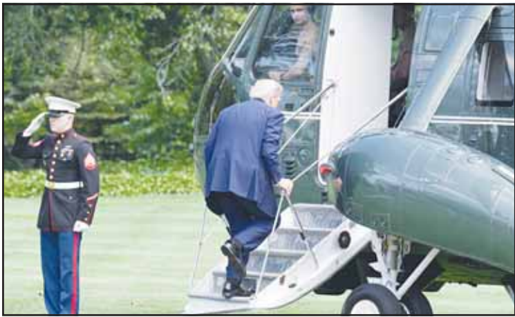
US President Donald Trump boards Marine One as he departs the White House on May 23, in Washington.

WASHINGTON, May 24, US President Donald Trump is ordering a major overhaul of the National Security Council that will shrink its size, lead to the ouster of some political appointees and return many career government employees back to their home agencies, according to two US officials and one person familiar with the reorganization. The number of staff at the NSC is expected to be significantly reduced, according to the officials, who requested anonymity to discuss the sensitive personnel matter. The shake-up is just the latest shoe to drop at the NSC, which is being dramatically made over after the ouster early this month of Trump’s national security adviser Mike Waltz, who in many ways had hewed to traditional Republican foreign policy. Secretary of State Marco Rubio has been serving as national security adviser since the ouster of Waltz, who was nominated to serve as Trump’s ambassador to the United Nations. The move is expected to elevate the importance of the State Department and Pentagon in advising Trump on important foreign policy moves. But, ultimately, Trump relies on his own instincts above all else when making decisions.