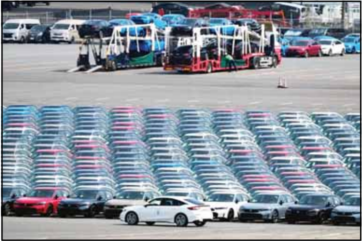
Workers, back, unload vehicles while a car, center front, is moved to another location of the area, where export vehicles are parked at the Daikoku vehicle terminal center in Yokohama, near Tokyo, April 8, 2025.

joins Amazon, Walmart and other major U.S. companies in the White House's crosshairs as they try to respond to the uncertainty and inflationary pressures unleashed by his tariffs. "I have long ago informed Tim Cook of Apple that I expect their iPhone's that will be sold in the United States of America will be manufactured and built in the United States, not India, or any-place else," Trump wrote. "If that is not the case, a Tariff of at least 25% must be paid by Apple to the U.S." Trump later clarified his post to say that all smartphones made abroad would be taxed and the tariffs could be coming as soon as the end of June. "It would be also Samsung and anybody that makes that product," Trump said. "Otherwise, it wouldn't be fair." The statements by Trump are critical in that he suggests the company itself would bear the price of tariffs, contradicting his earlier claims as he rolled out a series of aggressive tariffs over the past several months that foreign countries would shoulder the cost of the import taxes. In general, importers pay the tariffs and the costs are often passed along to consumers in the form of higher prices. In response to Trump's tariffs on China, Apple CEO Tim Cook said earlier this month that most iPhones sold in the U.S. during the current fiscal quarter would come from India, with iPads and other devices being imported from Vietnam.