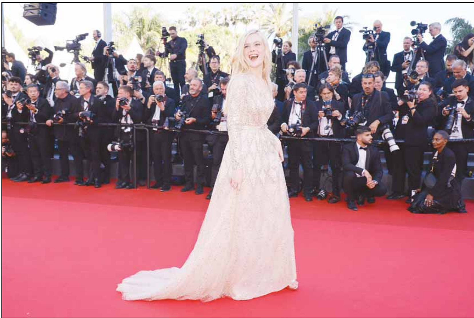
Elle Fanning poses for photographers upon arrival at the premiere of the film 'The Mastermind' at the 78th international film festival, Cannes, southern France, May 23. (AP)