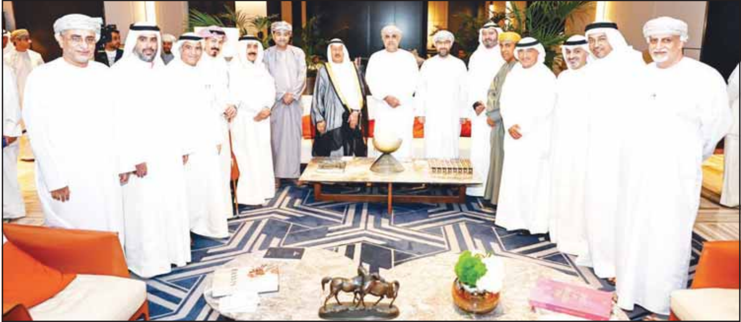
A group photo of the guests who attended the meeting.

His Highness the Prime Minister Sheikh Ahmad Abdullah Al-Ahmad Al-Sabah also sent Saturday a cable of congratulations to Eritrean President Isaias Afwerki on his country's Independence Day.