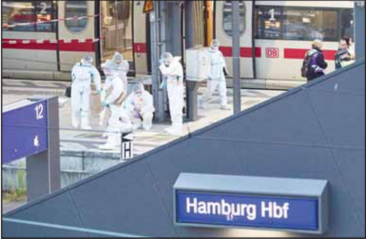
Police and forensics work near the crime scene after a stabbing attack at Hamburg Central Station on May 23, in Hamburg, Germany.