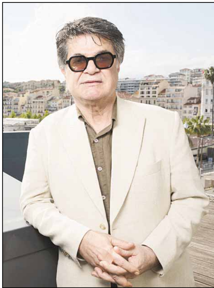
Director Jafar Panahi poses for a portrait photograph for the film 'It Was Just an Accident' at the 78th international film festival, Cannes, southern France, Wednesday, May 21.

About 160,000 households in the Alpes-Maritimes department lost electricity after a high-voltage line fell Saturday morning, electricity network operator RTE said on X. The outage came hours after a fire at an electrical substation near Cannes overnight had already weakened the grid.