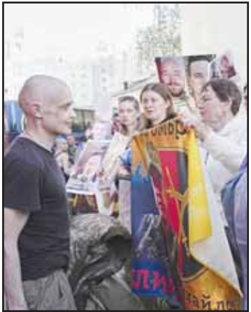
Family members of Ukrainian prisoners hold photos of servicemen in captivity during a POWs exchange between Russia and Ukraine, in Chernyiv region, Ukraine on May 23.