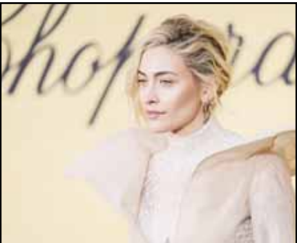
Paris Jackson poses for photographers upon arrival at the amfAR Cinema Against AIDS benefit at the Hotel du Cap-Eden-Roc, during the 78th Cannes international film festival, Cap d'Antibes, southern France, Thursday, May 22.

LOS ANGELES: A man charged with stalking Jennifer Aniston and crashing his car through the front gate of her home has been found mentally incompetent to stand trial, but he demanded a second opinion at a court hearing Thursday.