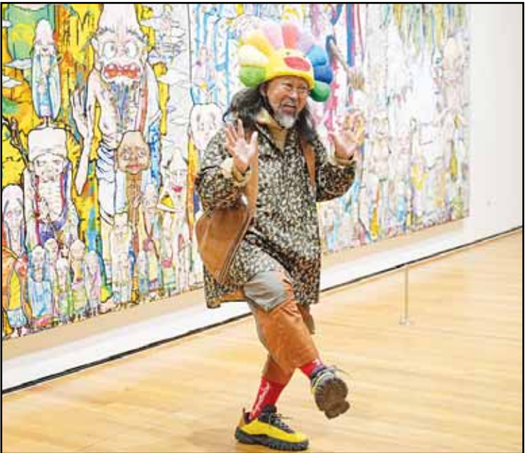
Takashi Murakami greets visitors to an exhibit of his art at the Cleveland Museum of Art in Cleveland, Thursday, May 15.