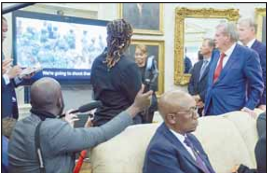
South African businessman Johann Rupert, standing right, watches a video during a meeting between President Donald Trump and South African President Cyril Ramaphosa in the Oval Office of the White House on May 21, in Washington.

JOHANNESBURG, May 24, South Africa’s top law enforcement official said Friday that US President Donald Trump wrongly claimed that a video he showed in the Oval Office was of burial sites for more than 1,000 white farmers and he “twisted” the facts to push a false narrative about mass killings of white people in his country. Police Minister Senzo Mchunu was talking about a video clip that was played during the meeting between Trump and South African President Cyril Ramaphosa at the White House on Wednesday that showed an aerial view of a rural road with lines of white crosses erected on either side. “Now this is very bad,” Trump said as he referred to the clip that was part of a longer video that was played in the meeting. “These are burial sites, right here. Burial sites, over a thousand, of white farmers, and those cars are lined up to pay love on a Sunday morning.” Mchunu said the crosses did not mark graves or burial sites, but were a temporary memorial put up in 2020 to protest the killings of all farmers across South Africa. They were put up during a funeral procession for a white couple who were killed in a robbery on their farm, Mchunu said. A son of the couple who were killed and a local community member who took part in the procession also said the