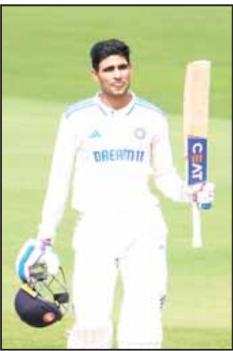
In this file photo, India's Shubman Gill celebrates his century on the third day of the second test match between India and England, in Visakhapatnam, India.

MUMBAI, India, May 24, Shubman Gill was named as India's new test skipper on Saturday to lead the team on its five-test tour of England starting June 20. The 25-year-old batter takes over from Rohit Sharma, who announced his retirement from test cricket this month followed by batting great Virat Kohli doing the same. Sharma last led India against Australia during the Boxing Day test. "We discussed every option that's there, over the last year or so, and we have looked at Shubman various times," selection committee chairman Ajit Agarkar said. "We have taken a lot of feedback from the dressing room. We are hopeful he is the guy - he is a terrific player and our best wishes to him." Gill will lead India for the first time in tests, having had only T20 captaincy experience prior. He had led India in Zimbabwe in 2024 when other senior players were rested. He currently leads Gujarat Titans atop the Indian Premier League. His ascension to Indian cricket's top job comes ahead of the 2025-27 world test championship cycle - India begins its campaign against England. "You don't pick captains for one tour or two tours," Agarkar said. "We have seen some progress over the last year or two with him. No doubt, it is going to be tough as it gets." Headingley in Leeds is the setting