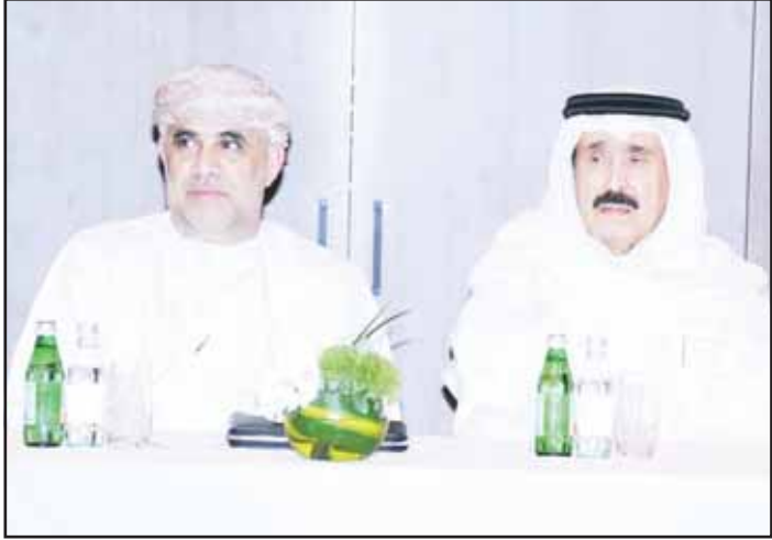
Omani Minister of Housing and Urban Planning Dr. Khalfan Al-Shuaili and Editor-in-Chief of Arab Times and Al-Seyassah newspapers Ahmed Al-Jarallah.