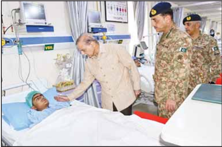
In this photo released by the Prime Minister Office, Prime Minister Shehbaz Sharif, (center), checks on a child injured in the suicide bombing in Khuzdar, as Army Chief Field Marshal Asim Munir, (second right), looks on during their visit to a hospital in Quetta, Pakistan on May 21.

NEW DELHI, May 24, (Agencies): The Indian government Friday extended the NOTAM (Notice to Airmen) for Pakistan flights until June 23, officials said. According to the NOTAM issued by the federal ministry of civil aviation, no aircraft registered in Pakistan, and operated, owned or leased by Pakistani airlines or operators will be allowed to enter the Indian airspace till June 23. The airspace ban also applies to Pakistani military aircraft as per the NOTAM. Also: ISLAMABAD: The death toll from a school bus bombing in southwestern Pakistan rose to eight on Friday after three more critically wounded children died, according to the country’s military, which blamed rival India for allegedly supporting rebels behind the attack. The victims included two soldiers who were aboard the bus when it was attacked Wednesday in Khuzdar, a city in Balochistan province, where a separatist insurgency has raged for decades. A total of 53 people, including 39 children, were wounded in the attack. The children were going to their Army Public School when the bombing happened. Military spokesperson Lt Gen Ah-