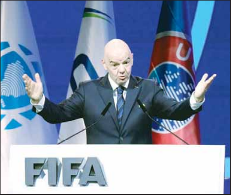
FIFA President Gianni Infantino addresses the FIFA 75th Congress at the Connebol Convention Center in Luque, Paraguay.