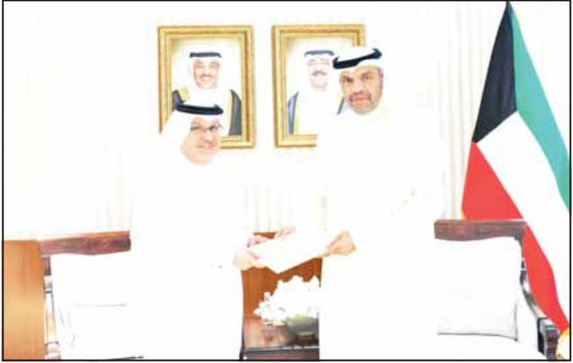
Bahrain's Ambassador to Kuwait Salah Al-Maliki hands over the letter to Kuwait Foreign Minister Abdullah Al-Yahya.

The first pillar, she noted, involves designing integrated policies that align social, educational, health, and housing plans to create an enabling environment for family stability.