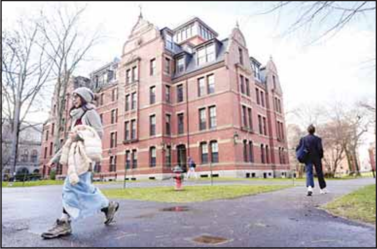
People walk between buildings, Dec 17, 2024, on the campus of Harvard University in Cambridge, Mass.

Harvard enrolls almost 6,800 foreign students at its campus in Cambridge, Massachusetts. Most are graduate students, and they come from more than 100 countries. The Department of Homeland Security announced the action Thursday, accusing Harvard of creating an unsafe campus environment by allowing “anti-American, pro-terrorist agitators” to assault Jewish students on campus. It also accused Harvard of coordinating with the Chinese Communist Party,