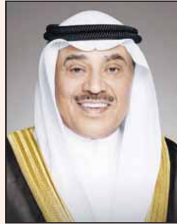
HH the Crown Prince

KUWAIT CITY, May 24, (KUNA): His Highness the Amir Sheikh Meshal Al-Ahmad Al-Jaber Al-Sabah's Representative, His Highness the Crown Prince Sheikh Sabah Khaled Al-Hamad Al-Sabah and his accompanying delegation will head to Malaysia on Sunday to lead Kuwait's delegation partaking in the second GCC-ASEAN summit and the GCC-ASEAN-China summit in Kuala Lumpur.