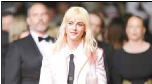
Director Kristen Stewart poses for photographers upon arrival at the premiere of the film 'Bono: Stories of Surrender' at the 78th international film festival, Cannes, May 16.