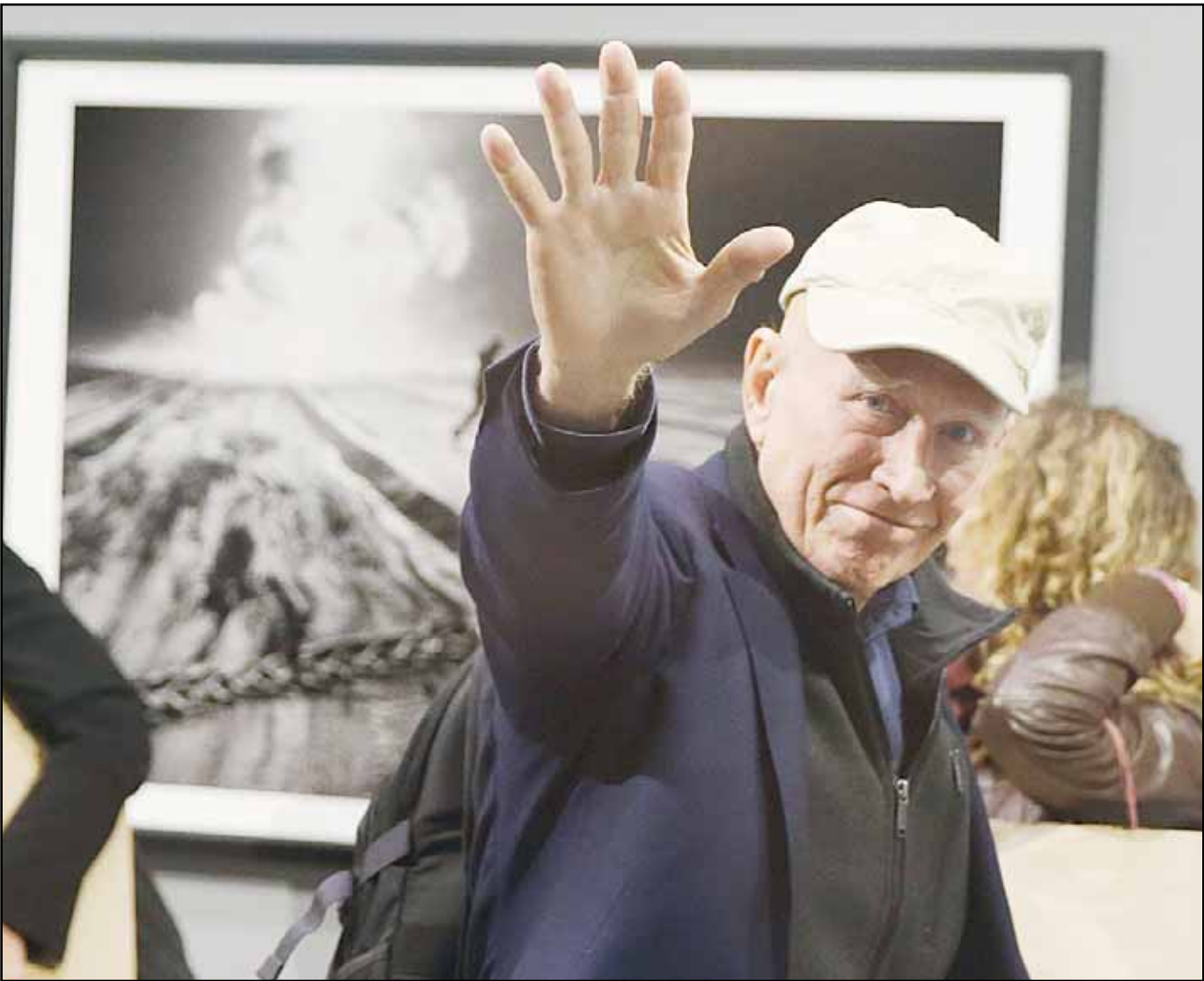
Photographer Sebastiao Salgado waves to photographers during the presentation of his exhibition, ‘Kuwait: A Desert on Fire’, at the Galleria Meravigli, in Milan, Italy, Oct. 20, 2017. Salgado, known for his long-term projects and images of nature and humanity, died at age 81, the Instituto Terra confirmed on Friday, May 23.

‘He fought for a humane, and ecological world’