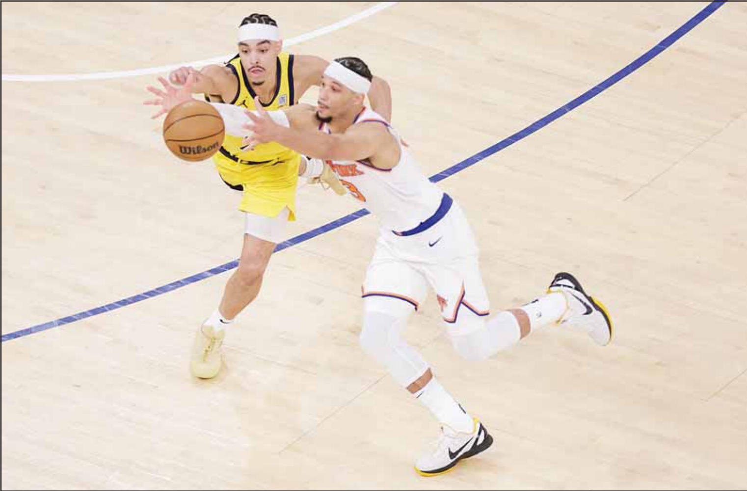
Indiana Pacers guard Andrew Nembhard (2) and New York Knicks guard Josh Hart (3) chase down a loose ball in overtime of Game 1 of the NBA basketball Eastern Conference final in New York.