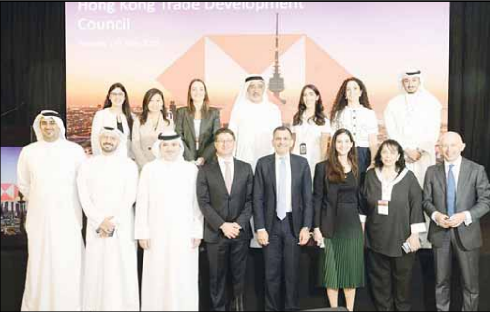
Group photo during the strategic talks.

na Harbour) and the Road Network project (China Gezhouba). Hong Kong, one of the world's top financial hubs, offers Kuwait a gateway to Asian markets, especially in asset management and Islamic finance. According to the Hong Kong Monetary Authority (HKMA), Hong Kong's assets under management reached over HK$35 trillion in 2023. With Kuwait's robust sovereign wealth fund and growing FinTech ecosystem,