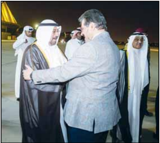
Minister of Amiri Diwan Affairs Sheikh Mohammad Abdullah Al-Mubarak Al-Sabah welcomes HH the PM.