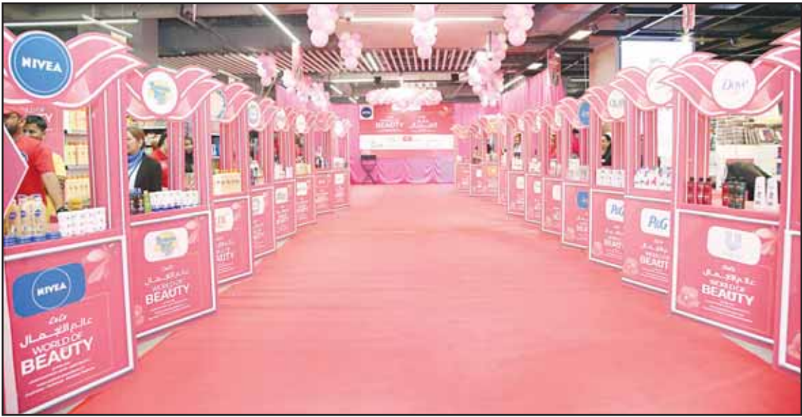
Skincare, perfumes, and more – world-class beauty brands on sale.

A week-long celebration of glamour and self-care