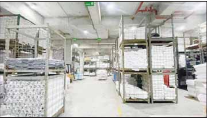
Bad storage of items in a warehouse.

— Compiled by Mahmoud Attiyeh/ Simi K.Kutty