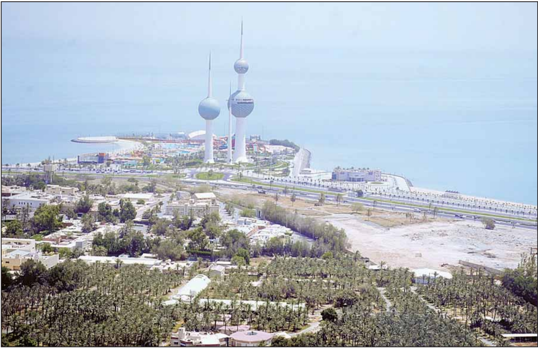
The iconic Kuwait Towers endure the blazing near 50°C heat, standing strong against the scorching Thursday sun.

Winds may whip up dust in some areas over the weekend