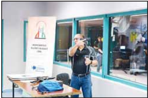
Some photos from the IDAK-KDD Shooting Championship 2025.