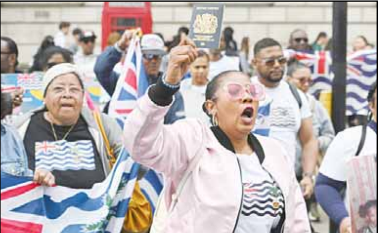
People demonstrate outside the Foreign Office in London on May 22 after a British court blocked the U.K. from transferring sovereignty over the Chagos Islands to Mauritius hours before the agreement was due to be signed. (AP)

LONDON, May 22, (AP): Britain signed an agreement Thursday handing sovereignty over the contested and strategically located Chagos Islands to Mauritius, a move the government says ensures the future of a US-UK military base that is vital to British security. The Indian Ocean archipelago is home to a strategically important naval and bomber base on the largest of the islands, Diego Garcia. Under the agreement, the UK will pay Mauritius 101 million pounds ($136 million) per year to lease back the base for at least 99 years. Starmer said that base, operated by US forces, is crucial for British counterterrorism and intelligence and is “right at the foundation of our safety and security at home.” The signing was delayed for several hours after a UK judge imposed a last-minute injunction blocking the transfer. That was later lifted by another judge. High Court judge Martin Chamberlain said after a hearing on Thursday that an injunction barring the handover