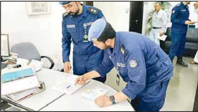
KFF personnel issuing citations.