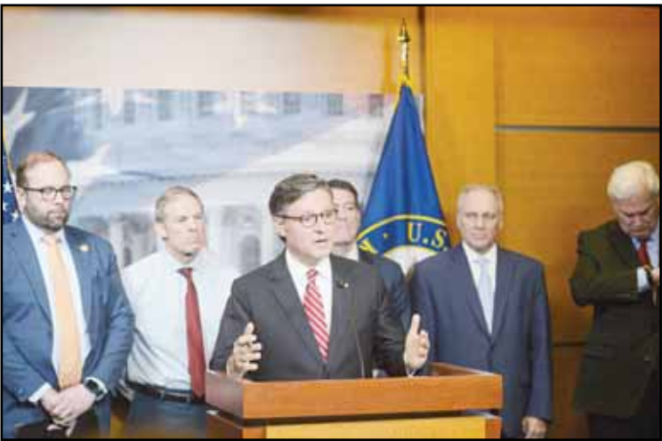
US Speaker of the House Mike Johnson, R-La., center, is joined by from left: Rep. Jason Smith, R-Mo., Rep. Jim Jordan, R-Ohio, Rep. Mark Green, R-Tenn., House Majority Leader Steve Scalise, R-La., and House Majority Whip Tom Emmer, R-Minn., during a news conference at the Capitol on May 20, in Washington.

White House - to accomplish. They believe it will be “rocket fuel,” as one put it during debate, for the uneasy U.S. economy. Trump himself demanded action, visiting House Republicans at Tuesday’s conference meeting and hosting GOP leaders and the holdouts for a lengthy session Wednesday at the White House. Before the vote, the administration warned in a pointed statement that “failure to pass this bill would be the ultimate betrayal.” Central to the package is the GOP’s commitment to extending some $4.5 trillion in tax breaks they engineered during Trump’s first term in 2017, while temporarily adding new ones he campaigned on during his 2024 campaign, including no taxes on tips, overtime pay, car loan interest and others. To make up for some of the lost tax revenue, the Republicans focused on changes to Medicaid and the food stamps program, largely by imposing work requirements on many of those receiving benefits. There’s also a massive rollback of green energy tax