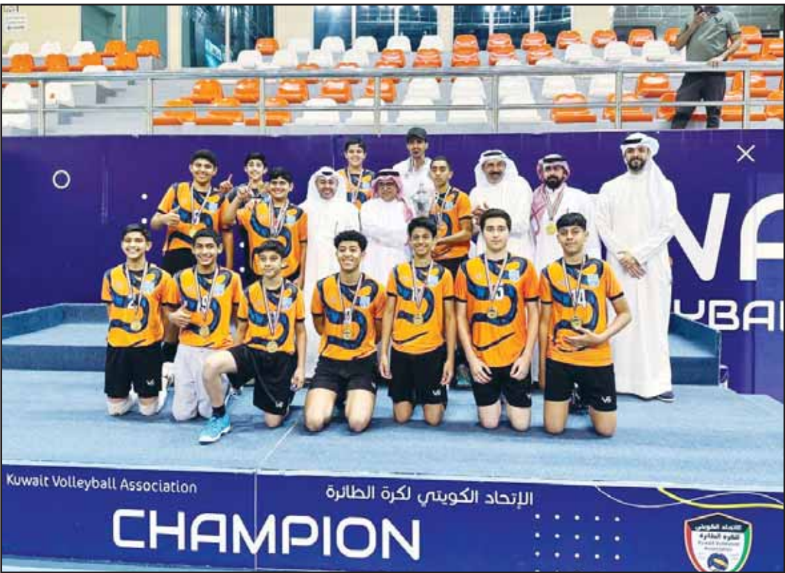
Kazma celebrates on the podium with officials.