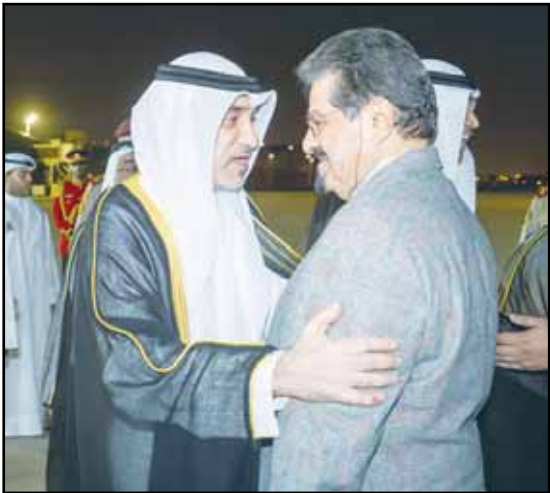
First Deputy Prime Minister and Minister of Interior Sheikh Fahad Yousef Saud Al-Sabah welcomes HH the PM