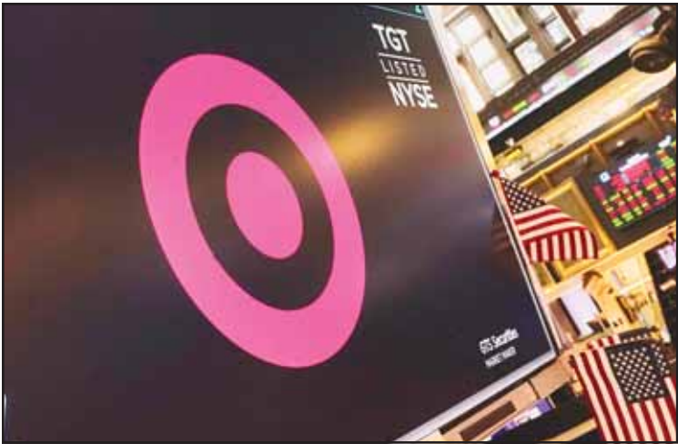
The logo for Target is displayed above a trading post on the floor of the New York Stock Exchange, Tuesday, May 20, 2025.