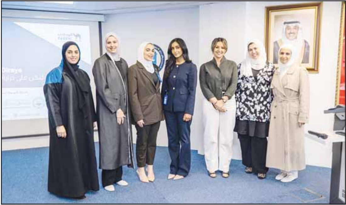
NBK team with members of the 'Lei W Lakom' initiative.

NBK also called to always check the identity of individuals or companies before disclosing sensitive information or making any transaction that requires personal information, especially with the constantly evolving fraud tactics that scammers follow, like pretending to be friends and family through WhatsApp and e-mails to steal money or pretending to be bank and official institution employees to steal bank-