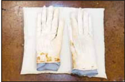
A pair of blood-stained gloves that Abraham Lincoln had when he was assassinated at Freeman's/Hindman in West Loop, Chicago, May 15.