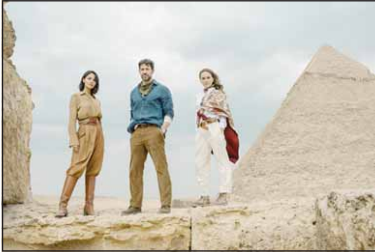
This image released by Apple TV+ shows Eiza Gonzalez, (from left), John Krasinski, and Natalie Portman in a scene from the film 'Fountain of Youth.'

Her character, Charlotte, is an art historian who had an adventuresome childhood with her explorer father and brother Luke (Krasinski) but has since settled for a more stable life. We meet her amid a contentious divorce and custody battle over her 12-year-old son, and she's not exactly pleased when Luke steals a piece of art from her gallery and attempts to recruit her for the bigger mission. But soon, she's in scuba gear hunting down a lost Rembrandt in the wreckage of the RMS Lusitania.