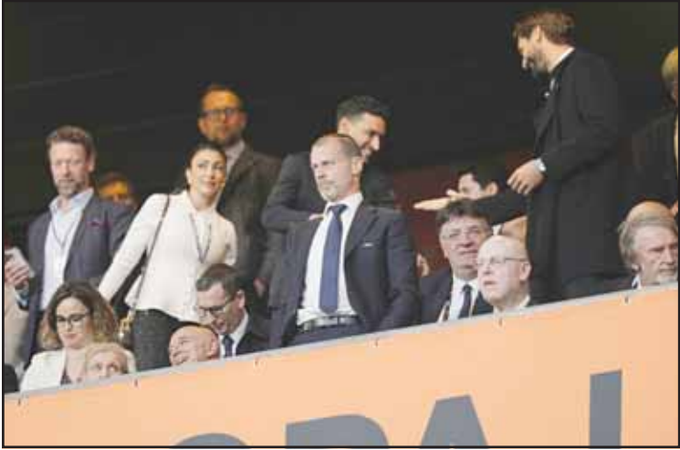
UEFA President Aleksander Ceferin, center, attends during the Europa League final soccer match between Tottenham Hotspur and Manchester United at the San Mames Stadium in Bilbao, Spain.

been postponed "for operational reasons" until the next Executive Committee meeting in September. The committee also approved an increase in the number of players who can be registered by teams in this year's Nations League finals from 23 to a maximum of 26, "considering the dynamics of the end of season as well as an increase in activities over the summer of 2025." On the club benefits program, UEFA said that for the next cycle linked to Euro 2028, 240 million euros ($272 million) will be distributed in accordance with the memorandum of understanding between UEFA and the European Club Association. UEFA said 7 million euros ($7.9 million) remains available for distribution from the previous club benefits cycle. After a proposal from the ECA, UEFA said that it was agreed to shift 3 million euros ($3.4 million) of the leftover from the 2020-24 cycle to the club benefit program for Women's Euro 2025, increasing its size from 6 million euros ($6.8 million) to 9 million euros ($10.2 million). The club benefits program is the clubs' share of the Euros revenue. It's the daily rate UEFA pays to clubs whose players are called up to national teams. It was created in 2008 to recognize the newly-launched ECA as a more democratic representative of teams' interests.