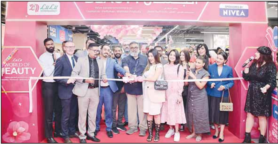
Inauguration of the 'Lulu World of Beauty' promotion at the Fahaheel Hypermarket branch.