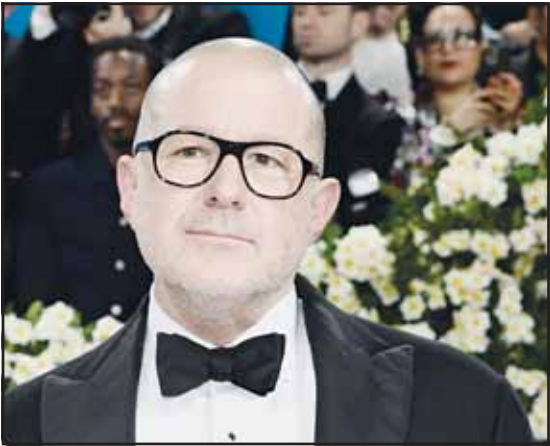
Jony Ive attends The Metropolitan Museum of Art's Costume Institute benefit gala celebrating the opening of the 'Superfine: Tailoring Black Style' exhibition on Monday, May 5, 2025, in New York.