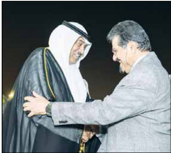
His Highness the Crown Prince Sheikh Sabah Khaled Al-Sabah receives HH the PM .