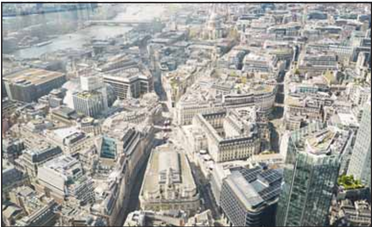
View of the Bank of England and the Royal Exchange from the Lookout viewing point, in London, Wednesday, April 9, 2025.