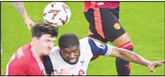
Tottenham's Kevin Danso, right, and Manchester United's Harry Maguire fight for the ball during the Europa League final soccer match between Tottenham Hotspur and Manchester United at the San Mames Stadium in Bilbao, Spain.