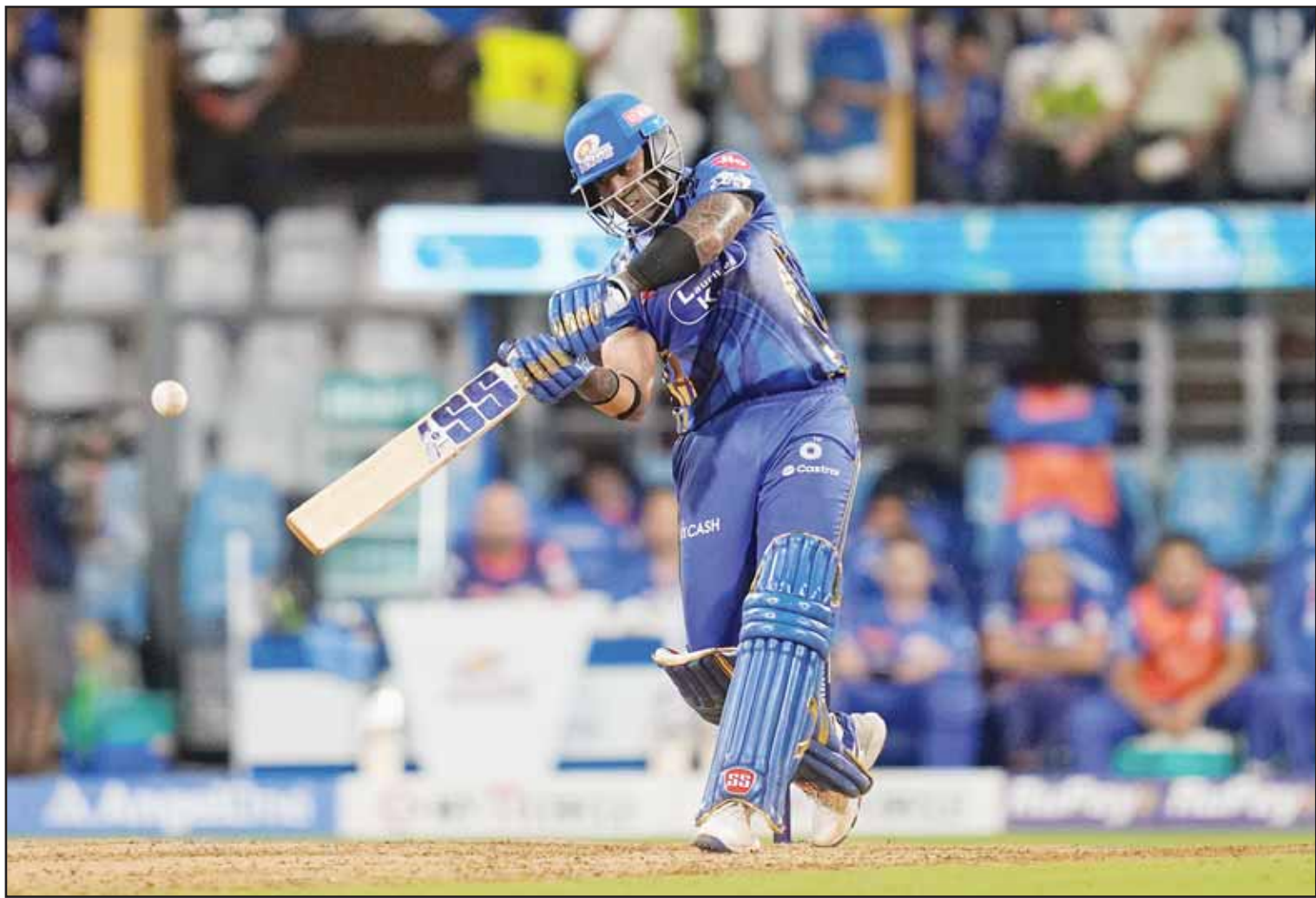
Mumbai Indians' Suryakumar Yadav plays a shot during the Indian Premier League cricket match between Mumbai Indians and Delhi Capitals at Wankhede Stadium in Mumbai, India.