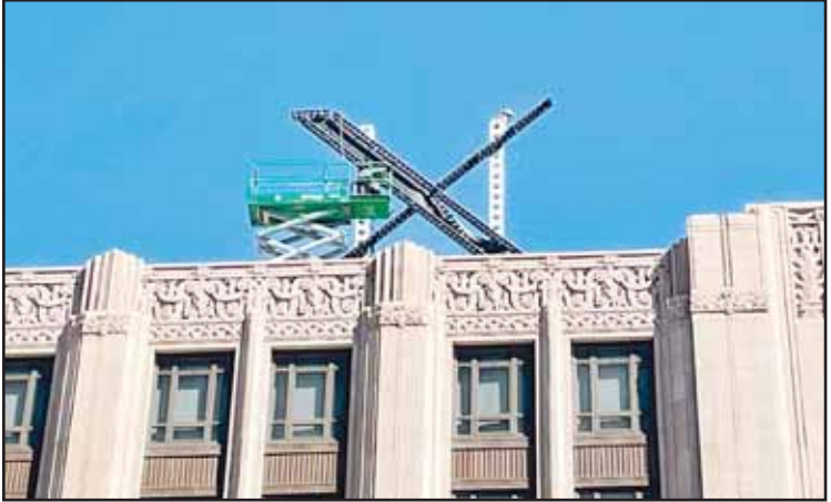
A large, metal 'X' sign is seen on top of the downtown building that housed what was once Twitter, now rebranded by its owner, Elon Musk, in San Francisco, July 28, 2023. (AP)

DAR ES SALAAM, Tanzania, May 22, (AP): Authorities in Tanzania on Wednesday blocked access to the social platform X after cyberattacks on some accounts of government institutions resulted in fake or pornographic posts. After authorities said it was taken over by hackers late Tuesday, the police account posted pornographic images that later were deleted. The account also falsely announced the death of President Samia Suluhu Hassan. “We are searching for those spreading false information,” police said in a statement. The account of telecommunications company Airtel Tanzania was also hacked. Government spokesman Gerson Msigwa said Tanzania’s cyberspace is secure and called the attacks a minor incident. He urged citizens to remain calm. “I assure you Tanzania is safe, and we will find those responsible,” he said. On Wednesday, X remained inaccessible within Tanzania for those not using a virtual private network. But users of VPNs without permission can face jail terms or fines. Many politicians, intellectuals and