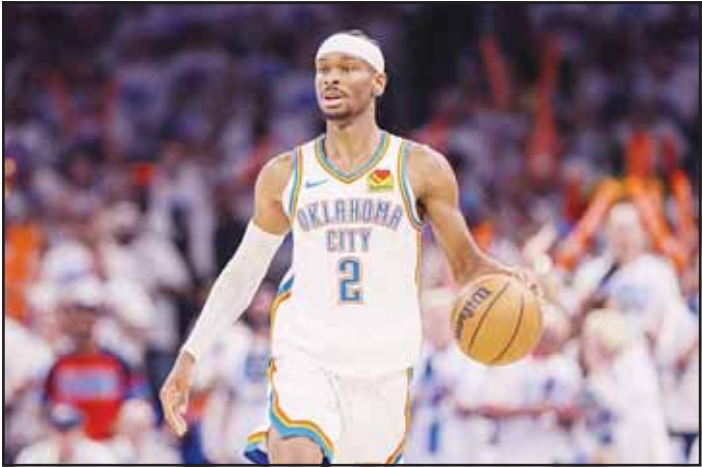
Oklahoma City Thunder guard Shai Gilgeous-Alexander dribbles the ball up court against Minnesota Timberwolves during the second half of Game 1 of an NBA basketball Western Conference Finals playoff series in Oklahoma City.

WASHINGTON, May 22, The case for Shai Gilgeous-Alexander was simple. He's the best player on an Oklahoma City Thunder team that had the best record this season and set a league mark for margin of victory. If that wasn't enough, he also won the scoring title. That's an MVP year. Gilgeous-Alexander was announced as the NBA's Most Valuable Player, his first time winning the award. It's now seven straight years that a player born outside the U.S. won MVP, extending the longest such streak in league history. "You try so hard throughout the season to like not think about it and just worry about playing basketball and getting better and trying to win games," Gilgeous-Alexander said on TNT, when the results were unveiled. "But as a competitor and as a kid dreaming about the game, it's always in the back of your mind." It ultimately was a two-person race. Gilgeous-Alexander got 71 first-place votes and 29 second-place votes; Denver's Nikola Jokic got the other 29 first-place votes and the other 71 second-place votes. Milwaukee's Giannis Antetokounmpo was third, getting 88 of the 100 possible third-place votes. Gilgeous-Alexander - the No. 11 pick in the 2018 draft - averaged 32.7 points, 6.4 assists and five rebounds per game this season, leading the Thunder to a 68-14 record.