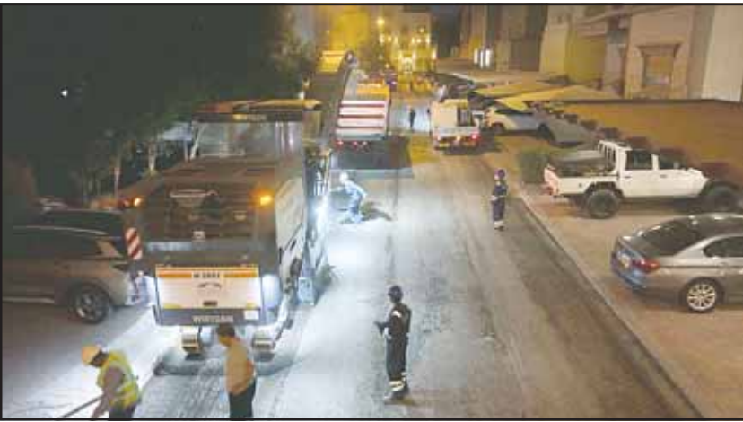
Road maintenance continues in Saad Al-Abdullah area.