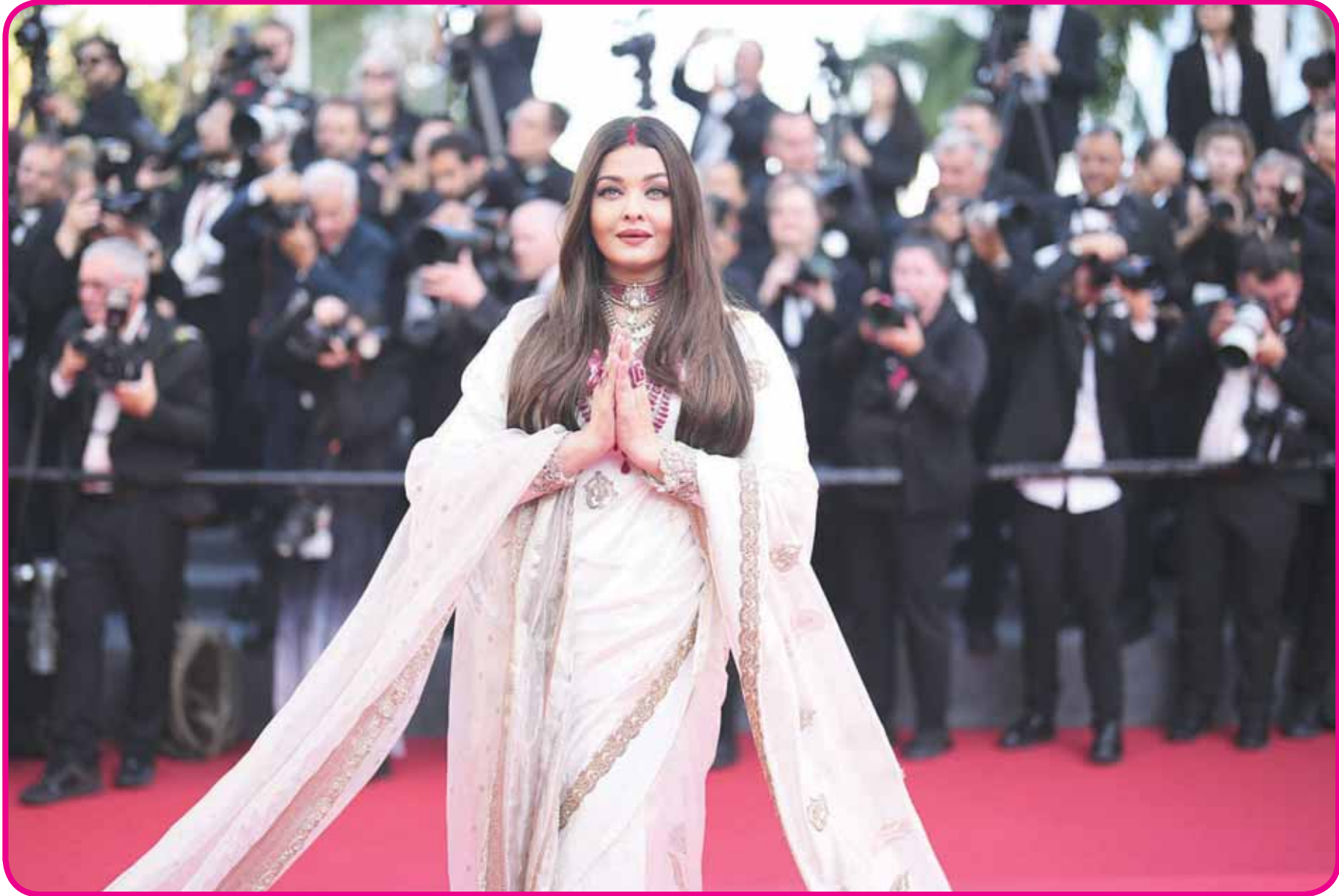
Aishwarya Rai Bachchan poses for photographers upon arrival at the premiere of the film 'The History of Sound' at the 78th international film festival, Cannes, southern France, Wednesday, May 21.

'Highest 2 Lowest' mixes crime, music, and NY spirit