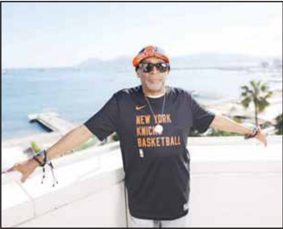
Director Spike Lee poses for a portrait photograph for the film 'Highest 2 Lowest' at the 78th international film festival, Cannes, southern France, Tuesday, May 20.

Lee, who last debuted 2018's "BlacKkKlansman" in Cannes, tried to avoid saying anything too pointed about President Don-