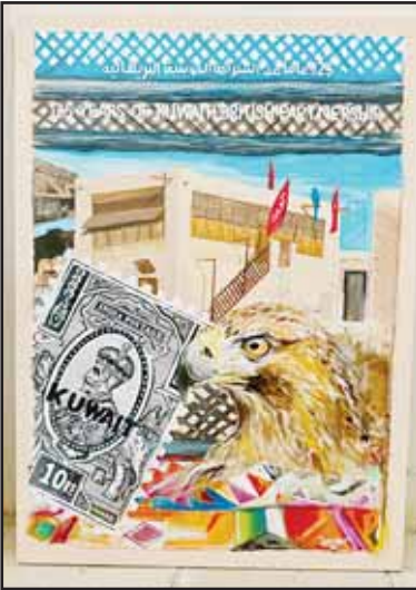
UK-Kuwait mural marks 125 years of ties, blending cultural symbols across two nations in vibrant public art.