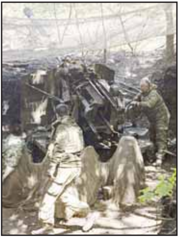
Ukrainian servicemen of the 127th Territorial Defence Brigade fire KS-19 100mm gun towards Russian positions near Kharkiv, Ukraine on May 16.

MOSCOW, May 22, Russia and Ukraine have scheduled no further direct talks on ending their more than three-year war, a Kremlin spokesman said Thursday, almost a week after the first face-to-face engagement between the countries’ delegations since 2022 and days after U.S. President Donald Trump announced they would start ceasefire negotiations “immediately.” “There is no concrete agreement about the next meetings,” Kremlin spokesman Dmitry Peskov told reporters. “They are yet to be agreed upon.” During two hours of talks in Istanbul last Friday, Kyiv and Moscow agreed to exchange 1,000 prisoners of war each, in what would be their biggest such swap. Apart from that step, the meeting delivered no significant breakthrough. Several months of intensified US and European pressure on the two sides to accept a ceasefire and negotiate a settlement have yielded little progress. Meanwhile, Russia is readying a summer offensive to capture more Ukrainian land, Ukrainian government and military analysts say. Putin said earlier this week that Moscow would “propose and is ready to work with” Ukraine on a “memorandum” outlining the framework for “a