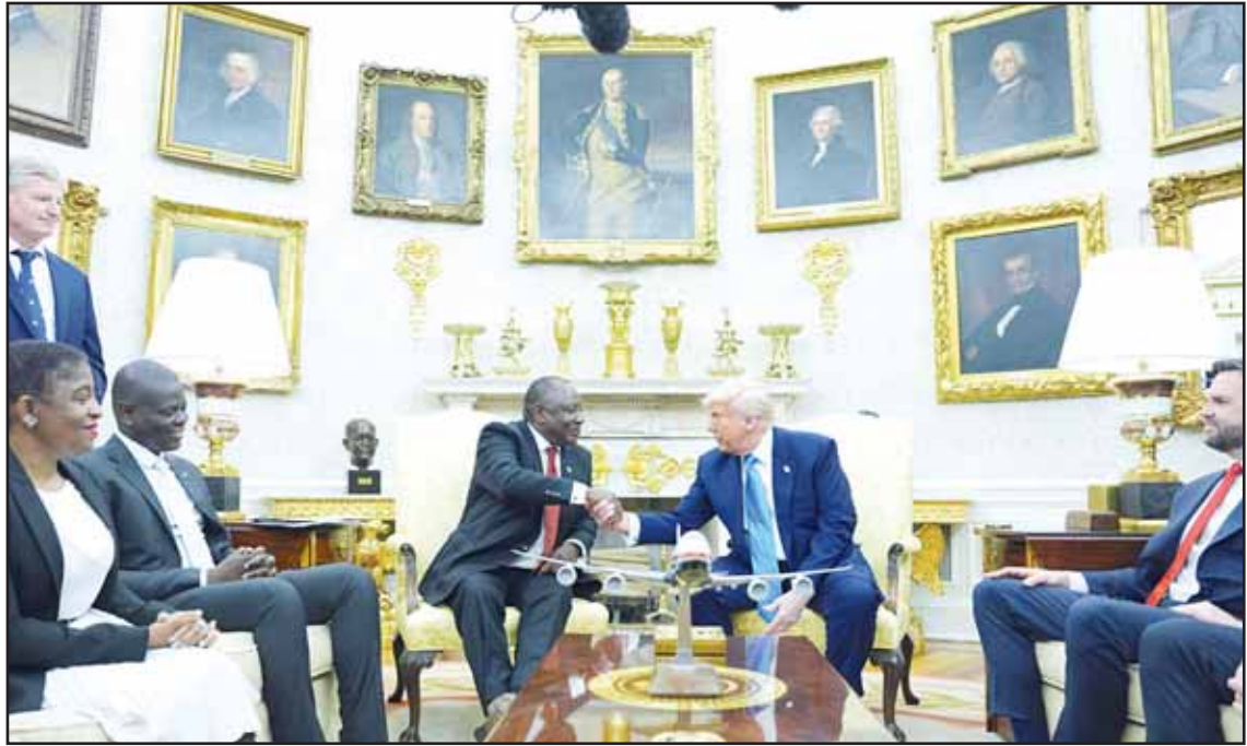
US President Donald Trump meets South African President Cyril Ramaphosa in the Oval Office of the White House on May 21 in Washington.