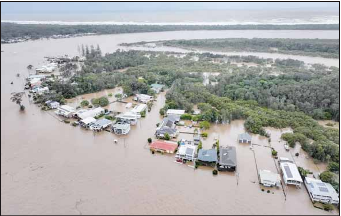
Flood waters surround houses in Port Macquarie, north of Sydney, Australia on May 22.