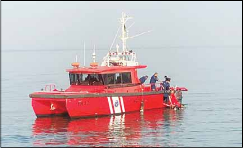
KFF personnel retrieve the dead body from the sea.