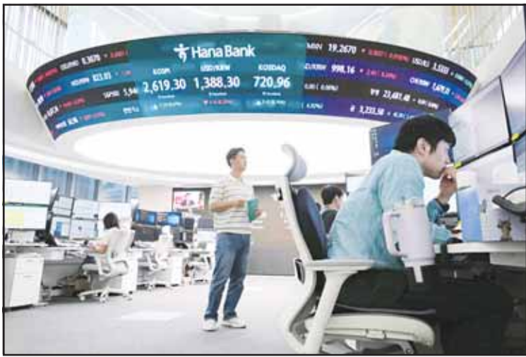
Currency traders work near a screen showing the Korea Composite Stock Price Index (KOSPI), top center left, and the foreign exchange rate between U.S. dollar and South Korean won, top center, at the foreign exchange dealing room of the KEB Hana Bank headquarters in Seoul, South Korea, Wednesday, May 21, 2025. (AP)

TOKYO, May 22, (AP): Asian shares fell Thursday after Wall Street slumped under pressure from the Treasury bond market and worries about surging U.S. debt. U.S. futures were little changed, while Japan's benchmark Nikkei 225 shed 0.8% to 36,988.36. Hong Kong's Hang Seng lost 0.5% to 23,711.58, while the Shanghai Composite was virtually unchanged, inching up less than 0.1% to 3,387.58. Australia's S&P/ASX 200 slipped 0.5% to 8,348.10. South Korea's Kospi dropped 1.3% to 2,591.95. Rising yields for U.S. Treasury bonds are a canary in the coal mine, Stephen Innes of SPI Asset Management said in a commentary. "The U.S. still has the biggest markets, the deepest liquidity, and the dollar's inertia working in its favor. But even inertia can't outrun compound interest and structural deficits forever," he wrote. The declining U.S. dollar also weighed on regional markets, according to some analysts, because some Asian nations have significant holdings in dollars. A weak dollar also hurts Asian exporters, such as Japanese automakers and electronics companies, by reducing the value of their overseas earnings when they are converted into yen. In currency trading, the U.S. dollar fell to 143.25 Japanese yen from