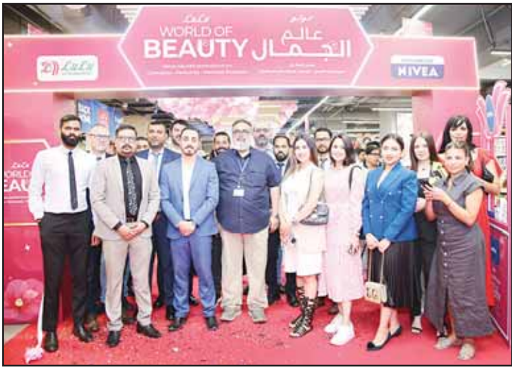
Beauty vloggers, influencers light up LuLu’s event launch.

Shoppers were treated to irresistible offers on a wide range of cosmetics, perfumes, skincare, and wellness products from some of