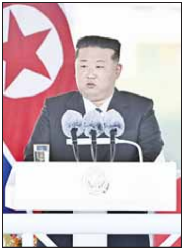
In this photo provided by the North Korean government, its leader Kim Jong Un speaks during a launching ceremony of a new naval destroyer at a western port in Nampo, North Korea, on April 25.

SEOUL, South Korea, May 22, North Korea’s second naval destroyer was damaged in a failed launch this week, state media reported Thursday, sparking fury from leader Kim Jong Un, who wants bigger warships to deal with what he calls escalating U.S.-led threats against his country. It’s not common for North Korea to acknowledge military-related setbacks, but observers say the disclosure of the failed ship launch suggests that Kim is serious about his naval advancement program and confident of ultimately achieving that objective. During a launching event at the northeastern port of Chongjin on Wednesday, the newly built 5,000-ton-class destroyer became unbalanced and was punctured in its bottom sections after a transport cradle on the stern section slid off first and became stuck, according to the Korean Central News Agency. KCNA didn’t provide details on what caused the problem, the severity of the damage or whether anyone was injured. According to KCNA, Kim, who was present at the ceremony, blamed military officials, scientists and shipyard operators for a “serious accident and criminal act caused by absolute carelessness, irresponsibility and unscientific empiricism.” Kim called for a ruling Workers’ Party meeting slated for late June to address their “irresponsible errors.” “It’s a shameful thing. But the reason why North Korea disclosed the incident is it wants to show it’s speeding up the modernization of its navy forces and ex