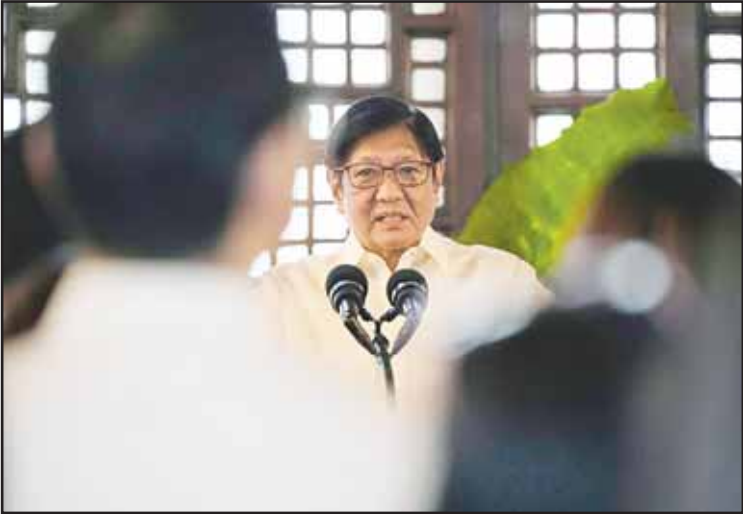
Philippine President Ferdinand Marcos Jr, speaks during the presentation of the newly enacted laws to stakeholders at the Malacanang Presidential Palace in Manila, Philippines on May 22.