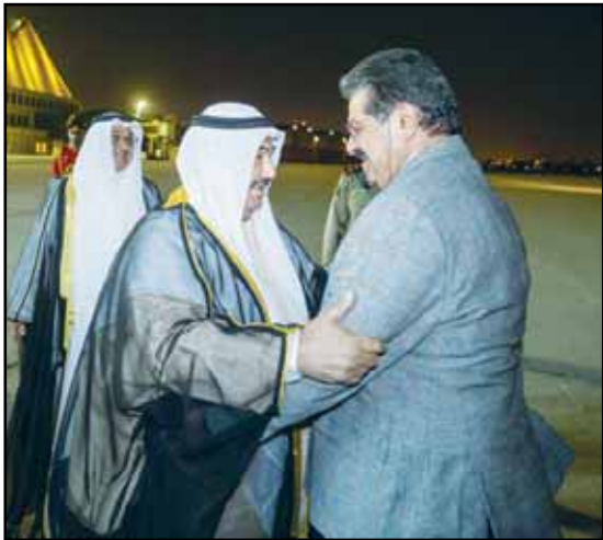
His Highness Sheikh Nasser Al-Mohammad Al-Ahmad Al-Sabah welcomes HH the PM