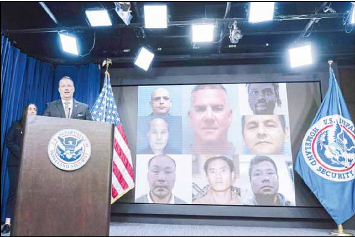
Acting director of US Immigration and Customs Enforcement (ICE) Todd Lyons, speaking during a news conference at ICE Headquarters, in Washington on May 21.