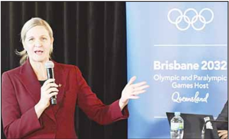
IOC president-elect Kirsty Coventry speaks at a press conference for the Brisbane 2032 Olympic and Paralympic Games in Brisbane, Australia.