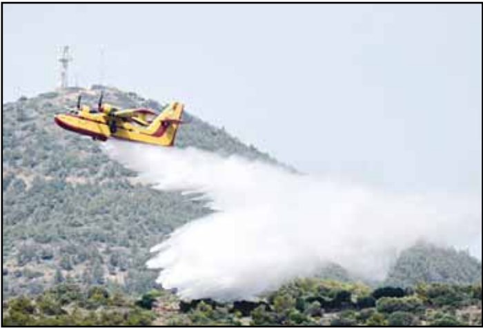
A firefighter plane drops water during the 'Through Fire 2025' drill over a forest in Lavrio, about 60 kilometres (37 miles) southeast of Athens, Greece on May 22.